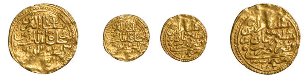
1216 Murad III, Sultani, Misr 982h, 3.32g/4h (Pere 274; A 1332.2; ICV 3173). Weak in parts, minor flan cracks, otherwise very fine £120-£150