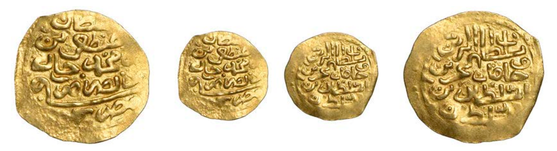
1230 Mustafa II, Sultani, Misr, date (1106h) unclear, 3.37g/11h (OC 22-021; ICV 3252). Peripheral weakness, otherwise very fine, rare £300-£400

1229 Ahmed II, Sultani, Misr, date (1102h) unclear, 3.41g/1h (OC 21-006; ICV 3239). Wavy flan, partly flat, otherwise very fine, scarce £200-£260