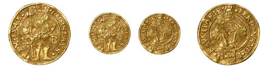
1023 Ferdinand I, Ducat, 1542KB, Kremnitz, 3.53g/11h (Husz. 895; F 48). Slightly creased and with internal crack, very fine £300-£400