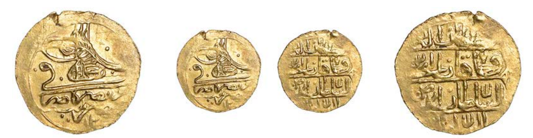
1260 Selim III, Zeri Mahbub, Misr 1203h, sad, 2.57g/12h (OC 28-028; ICV 3445). Peripheral weakness, small edge flaw, graffiti in obverse field, otherwise about extremely fine £120-£150