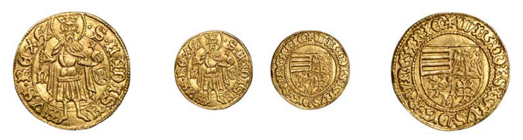
1017 Ladislaus I Jagiello (1440-53), Goldgulden, undated, c. 1443-4, Nagybanya, mm. N and shield, 3.36g/5h (Pohl F1-11; Huszar 597). Cleaned and edge partly smoothed, very fine £400-£600