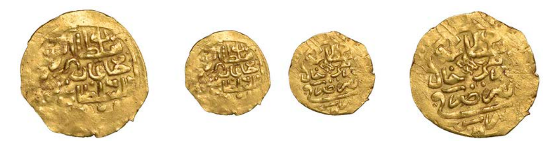
1227 Mehmed IV, Sultani, Misr 1058h, 3.36g/3h (A 1383; ICV 3216). Peripheral weakness, some light scrapes, otherwise about very fine £120-£150