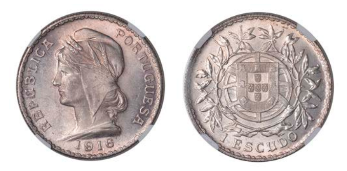
1128 Republic , Escudo, 1916 (Gomes 23.02; KM 564). Good extremely fine [certified and graded by NGC as MS 64] £150-£180

1127 Manuel II , 1000 Réis, 1910, Peninsular War Centenary (Gomes 07.01; KM 558). Good very fine £60-£80