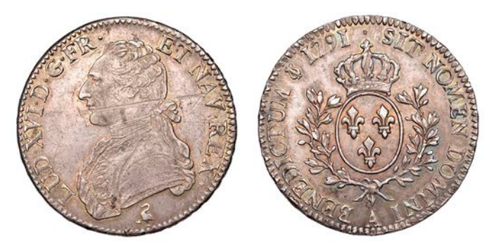
967 Louis XVI, Écus aux branches d'olivier, 1791<sup>A</sup> (Dup. 1708; Gad. 356). Extremely fine and lightly toned but scored across face £100-£120

G 968 Napoleon (as First Consul), 20 Francs, AN 12A, Paris (VG 1020; KM. 651; F 480). Very fine