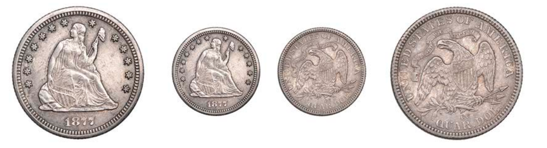
1190 Quarter Dollar, 1877cc. Extremely fine or better, lightly toned

1191 Five Cents, 1868; One Cent, 1862 [2]. Extremely fine