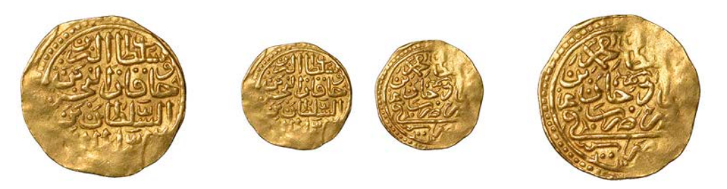
1220 Mehmed III, Sultani, Misr 1003h, 3.43g/2h (Pere 323; A 1340.2; ICV 3179). Weak in parts, otherwise very fine

Murad III, Maydin, Misr, no date visible (A 1335; ICV 3176); Mahmud I, Para (3), Misr 1143h (OC 24-046-01, 24-046-02; ICV 3317); Osman III, Para (2), Misr 1168h, 'ayn (OC 25-019; ICV 3348); Mustafa III, Para, Misr (11)87h (OC 26-040-02; ICV 3371); Abdul Hamid I, Para, Misr 1187h (OC 27-037-02; ICV 3414); Abdul Hamid II, 20 Para, Misr 1293h, yr 2 (OC 34-026-02) [9]. About very fine or better £80-£100