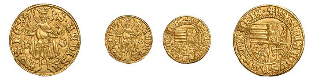
1018 Ladislaus V (1453-8), Goldgulden, undated, c. 1456, Sibiu (Hermannstadt), mm. н and G, 3.43g/12h (Pohl H7-172; Huszar 539). Better than very fine £500-£700