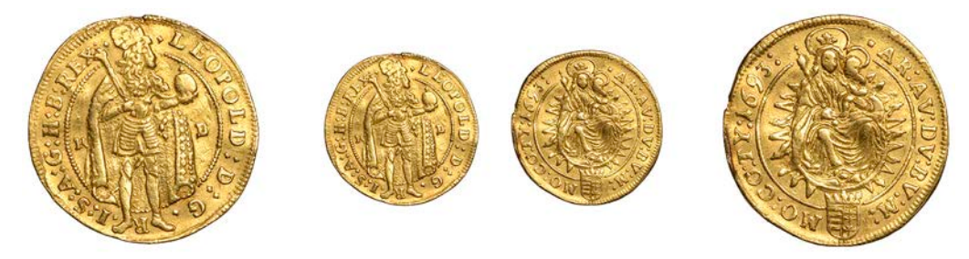
1025 Leopold I, Ducat, 1693κB, Kremnitz, 3.43g/3h (Her. 359; Husz. 1321; F 128). Traces of mount removal at 12 o'clock, about very fine £300-£400

1026 Leopold I, Half-Thaler, 1694κB, 15 Krajczar, 1678κB, both Kremnitz (Her. 844, 1045; Huszar 1402.1, 1425); TRANSYLVANIA, Gabriel Bethlen, Groschen, 1628, Nagybanya (Resch 488) [3]. First and last fine, second good very fine or better £120-£150