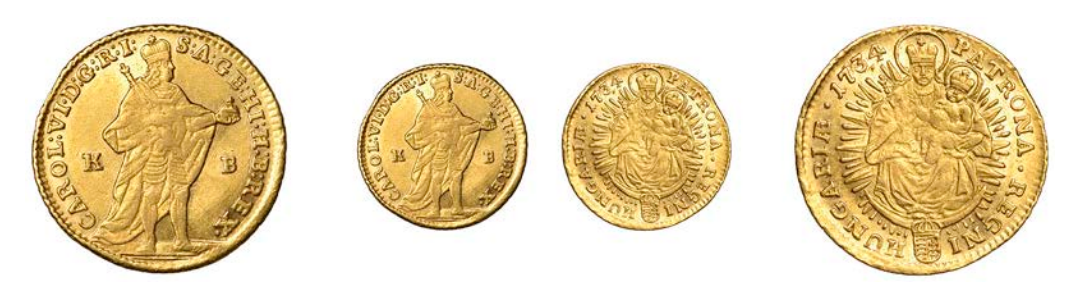
1028 Charles VI, Ducat, 1734KB, Kremnitz (Her. 161; Husz. 1586; F 171). About extremely fine

Of the six specimens sold since 2018 (mostly extremely fine), all fetched in excess of €10,000 including premium.