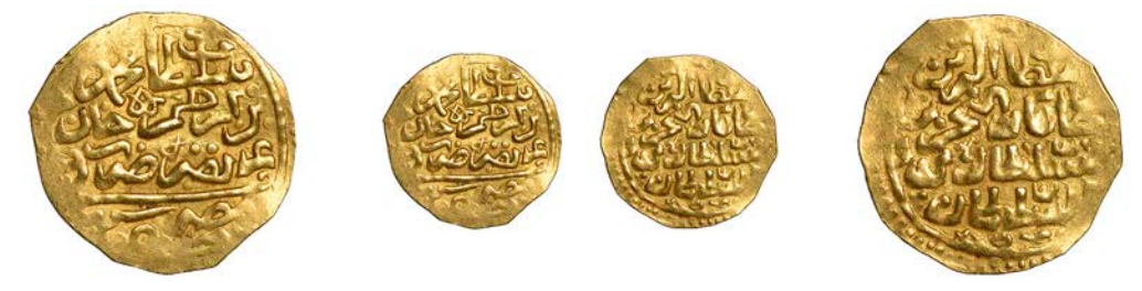
1224 Mehmed IV, Sultani, Misr 1058h, 3.50g/3h (A 1383; ICV 3216). Peripheral weakness, otherwise very fine

1223 Mehmed IV, Sultani, Misr, date (1058h) unclear, 3.47g/8h (A 1383; ICV 3216). Weak in parts, otherwise very fine £150-£180