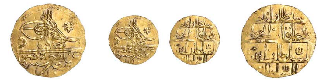
1267 Selim III, Zeri Mahbub, Misr 1203h, sad, 2.57g/12h (OC 28-028; ICV 3445). Minor peripheral weakness, about extremely fine £150-£180

Struck during the French occupation of Egypt; the letter ba is believed to stand for Bonaparte.