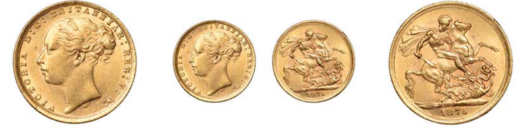
G 885 Victoria, Sovereign, 1875M (M 97; S 3857). Good very fine