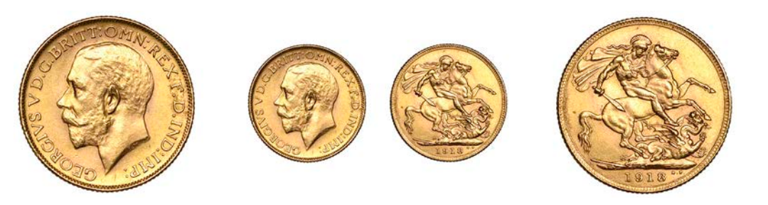
G 1058 George V, Sovereign, 1918 (SW 8.5; M 228; S 3998). Extremely fine or better