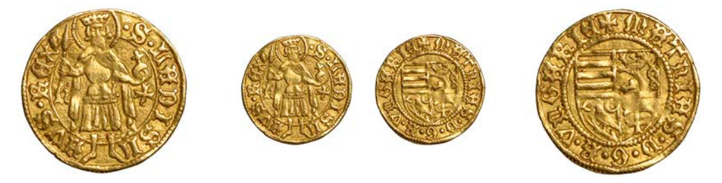
1020 Matthias Corvinus (1458-90), Goldgulden, undated, c. 1463-4, Nagybanya, mm. N and cross, 3.52g/9h (Pohl K1-17; Huszar 674). Nearly very fine £500-£700