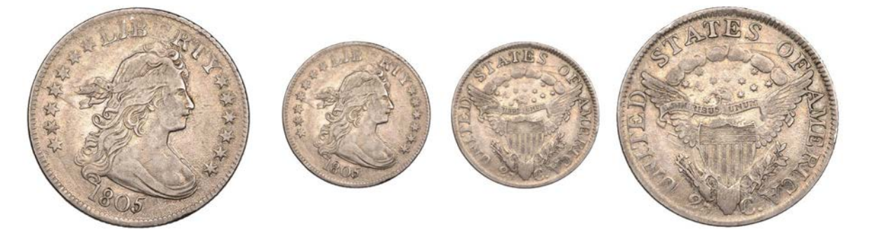
1189 Quarter-Dollar, 1805. Rim mark at 11 o'clock reverse, otherwise better than very fine, rare