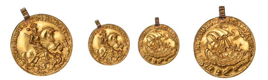
1033Medallic Ducat, 17th century, Kremnitz, probably by C.H. Roth, St George slaying dragon with lance, rev. Christ with two<br/>Apostles in vessel on a stormy sea, 3.43g/12h. With old loop-mount, slightly buckled, about extremely fine£400-£460