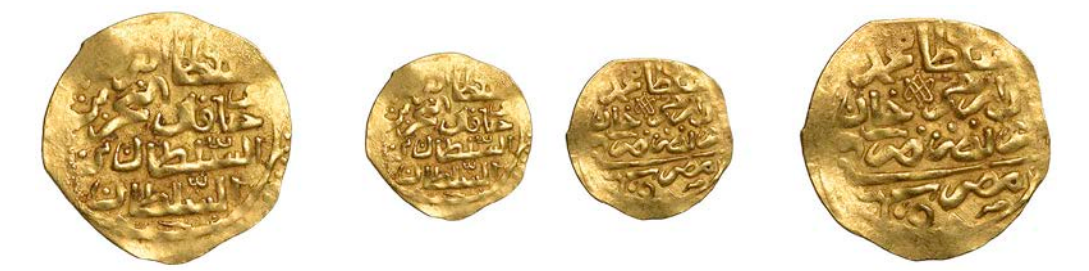
1226 Mehmed IV, Sultani, Misr 1058h, 3.38g/4h (A 1383; ICV 3216). Peripheral weakness, otherwise very fine

1225 Mehmed IV, Sultani, Misr, date (1058h) unclear, 3.39g/4h (A 1383; ICV 3216). Struck slightly off-centre, about very fine £120-£150