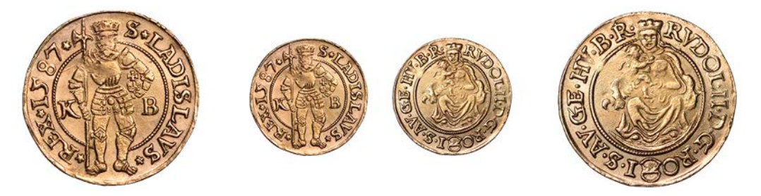
1024 Rudolph II , Ducat, 1587kB, Kremnitz, 3.50g/1h (Husz. 1002; F 63). Possibly removed from a mount, cleaned (or gilt?), very fine £240-£300