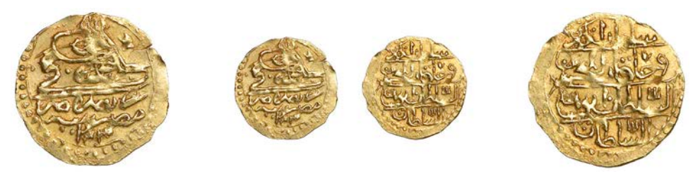
1259 Selim III, Half-Zeri Mahbub, Misr 1203h, ba, 1.29g/11h (Lec. 20; KM 151; ICV 3446). Small edge split, some die-rust, otherwise very fine, very rare £300-£400

Struck during the French occupation of Egypt; the letter ba is believed to stand for Bonaparte.