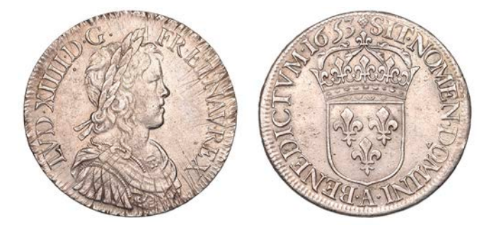
966 Louis XIV, Écu à la mèche longue, 1653<sub>A</sub> (Dup. 1469; Gad. 202). Good very fine but numerous light adjustment marks on obverse £200-£260