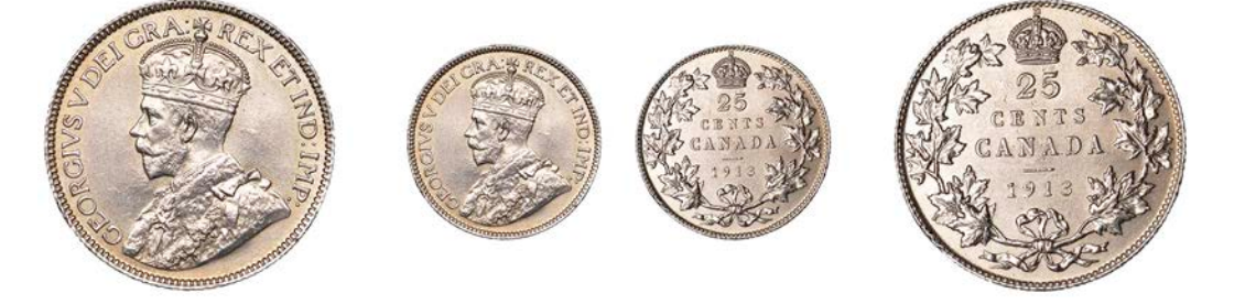
921 George V, 25 Cents, 1913 (KM 24). Lightly cleaned, otherwise about extremely fine