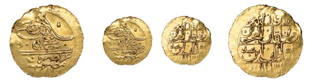
1252 Abdul Hamid I, Zeri Mahbub, Misr 1187h, 'abd, second toughra, 2.56g/12h (OC -; ICV 3412). Peripheral weakness, otherwise about extremely fine, very rare £200-£260