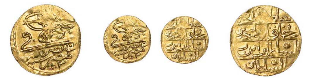
Selim III, Zeri Mahbub, Misr 1203h, ba, 2.43g/12h (Lec. 24; KM 152; ICV 3445). About extremely fine, very rare £1,200-£1,500 Struck during the French occupation of Egypt; the letter ba is believed to stand for Bonaparte.