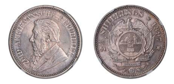
1154 ZAR, Halfcrown, 1897 (Hern Z35; KM 7). Extremely fine [certified and graded by NGC as MS 62]