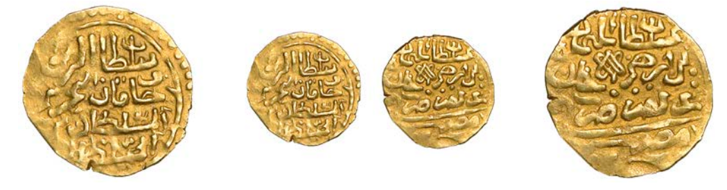
1228 Suleyman II, Sultani, Misr, date (1099h) unclear, 3.46g/9h (OC 20-009; ICV 3230). Minor peripheral weakness, otherwise very fine, rare £300-£400