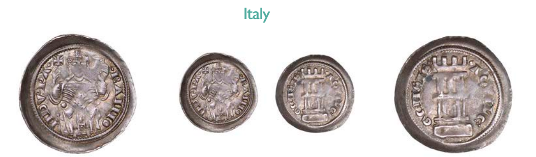
1066 AQUILEIA, Raimondo della Torre (1273-99), Denaro, 0.98g/8h (Bernardi 27; Biaggi 156). Good very fine and toned £200-£260

The last digit of each date has been erased from the die before striking. Currency issues of this denomination were struck on scalloped flans.