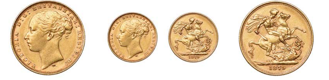
G 886 Victoria, Sovereign, 1879M (M 101; S 3857). Very fine

887 George V, Florin, 1934, Melbourne Centenary (KM 33). Cleaned, extremely fine