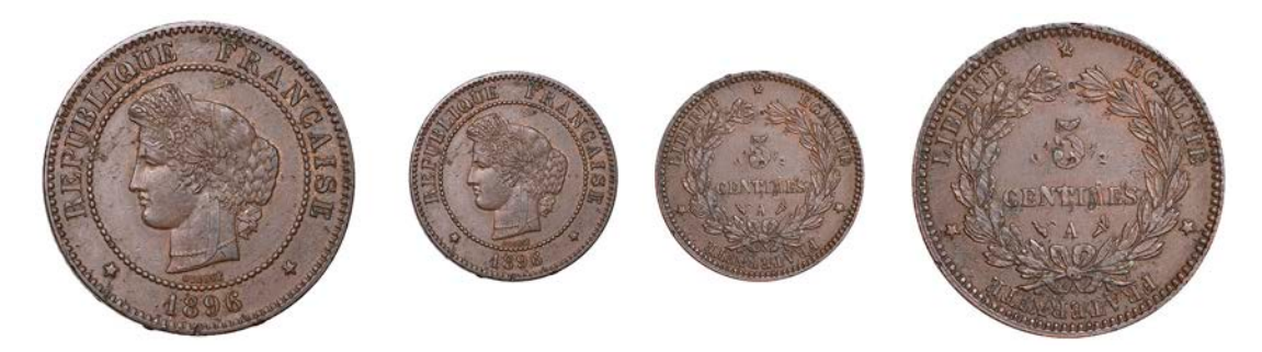
847 5 Centimes, 1896A, Paris, torch privy mark (Gad. 157a; KM 821.1). Some surface marks, otherwise about extremely fine, rare £100-£120

846 5 Centimes (49), 1879A (4), 1880A (2), 1881A (2), 1882A, 1883A (3), 1884A (4), 1885A (2), 1886A (2), 1887A (3), 1888A, 1889A (2), 1890A (2), 1891A (2), 1892A (3), 1893A (2), 1894A (4), 1896A (5), 1897A (3), 1898A (2) (Gad. 157a) [49]. Varied state £100-£150