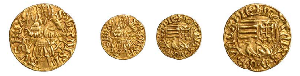
1021 Matthias Corvinus (1458-90), Goldgulden, undated, c. 1468-9, Nagybanya, mm. N and shield with crossed hammers, 3.45g/4h (Pohl K1-22; Huszar 674). Nearly very fine £500-£600