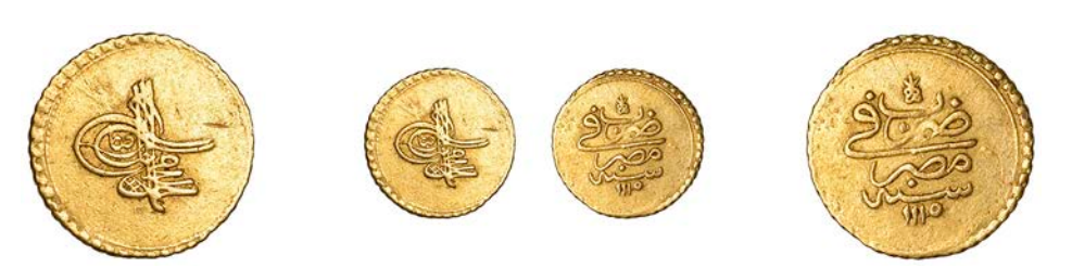
1231 Ahmed III, Findik, Misr 1115h, 3.43g/12h (OC 23-041; ICV 3275). About very fine