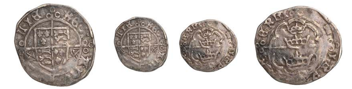
451 Groat, without mint name [Waterford], annulet crosses, Fitzgerald arms either side of shield, without H below crowns, 1.76g/4h (S 6432; DF 186A). Nearly very fine