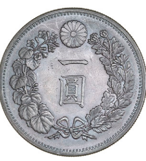
589 Mutsuhito , Yen, Meiji 13 [1880] (J & V Q9; KM. YA25.2). Trifling surface marks in reverse field, otherwise extremely fine and attractively toned £150-200