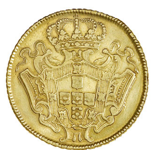
529 John V , 12,800 Réis, 1731, Minas Gerais (Gomes 61.05; KM. 139; F 55). Nearly very fine £800-1,000