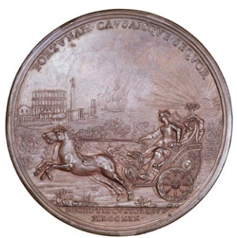
700 Escape of Princess Clementina Sobieski from Innsbrück, 1719, a bronze medal by O. Hamerani, bust left, rev. Princess riding towards Rome in a biga, 48mm (Woolf 36:1; MI II, 444/49; E 484). Extremely fine or better £300-400