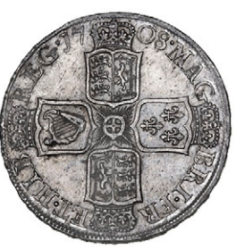
207 Halfcrown, 1708, edge SEPTIMO (ESC 577; S 3604). Very fine, toned £150-200