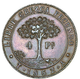
566 Republic, Pattern 4 Pesos, 1862 T-A, in copper, unsigned, arms in Garter, rev. tree and value, edge plain, 14.62g/12h (KM. Pn3). Good very fine £120-150