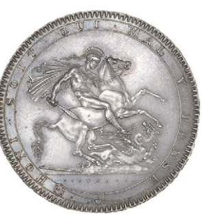
243 Crown, 1818, edge LVIII (ESC 211; S 3787). Some tiny surface digs, otherwise extremely fine £150-200