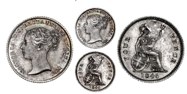
309 Britannia Groat, 1845 (ESC 1940; S 3913). Practically as struck, toned £80-100