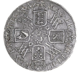
190 Crown, 1691, edge TERTIO (ESC 82; S 3433). Edge bruise at 6 o'clock, otherwise good very fine £1.200-1,500