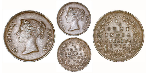
626 Victoria, Quarter-Cent, 1862 (Prid. 3; KM.4). About very fine, scarce £80-100