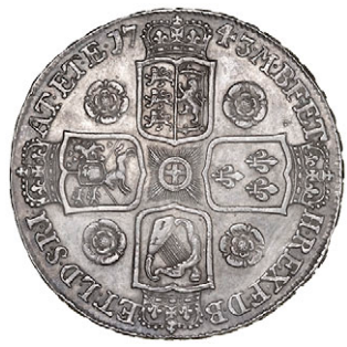
219 Crown, 1743, roses, edge DECIMO SEPTIMO (ESC 124; S 3688). Graffiti before bust, otherwise good very fine, toned £300-400