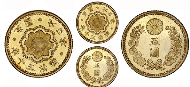
588 Mutsuhito , 5 Yen, Meiji 30 [1897] (J & V N29; KM. Y32; F 52). Better than extremely fine £500-600