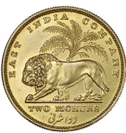
580 William IV , restrike Two Mohurs, 1835, RS incuse on truncation, edge grained (Prid. 1; KM. 452.1; F 1592). Removed from a mount and has been gilt, otherwise very fine or better, rare £900-1,200