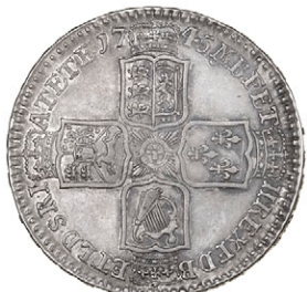
221 Halfcrown, 1745 LIMA, edge DECIMO NONO (ESC 605; S 3695). Better than very fine, lightly toned £150-200