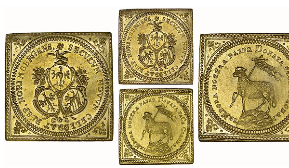
554 NUREMBERG, Imperial City, Klippe Ducat, 1700 CGL, 3.48g/12h (KM. 258; F 1886). Good extremely fine