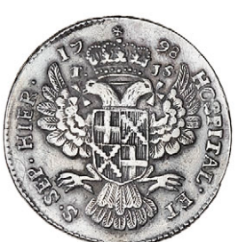
593 Ferdinand von Hompesch , 15 Tari, 1798 (RS 13; KM. 344). Perhaps cleaned at some time, otherwise about very fine £90-120

Believed to have been struck during the French occupation of the island