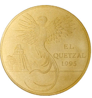
559 Republic, Pattern gold 10 Quetzales, 1995, arms, rev. symbolic bird (Bruce XPn9). Matt proof, as struck, UNIQUE £1,500-2,000