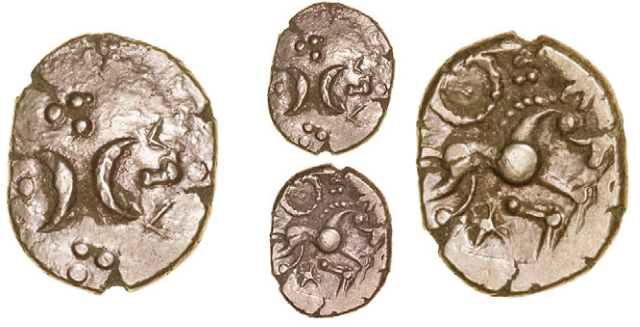
130 ICENI , Uninscribed issues, Stater [early Freckenham type], two opposed crescents, pellets in field, rev . horse right, pellet-ring above, four-pointed star below, 5.49g/11h ( cf. BMC 3387-9; cf. VA 620-7; S 426). About very fine, very rare £500-700