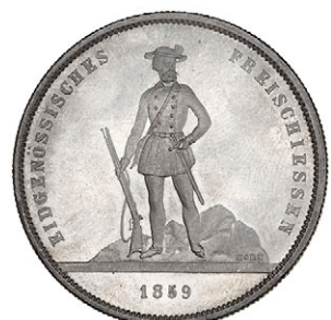
631 Zurich, 5 Francs, 1859 (KM S5; Dav. 379). A few tiny surface marks, otherwise virtually as struck £180-220

632 Republic , 5 Francs (39), 1936B (13), 1939 (4), 1941B (2), 1944B (3), 1948B (17) (KM. 41, 42, 44, 45, 48) [39]. Very fine to extremely fine £150-200