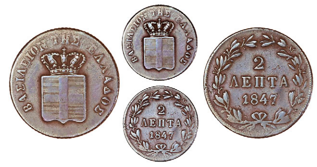
558 Otto, 2 Lepta, 1847 (Divo 27; KM. 27). About fine, rare date £80-100