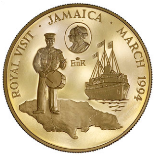
583 Elizabeth II , Proof 500 Dollars, 1994, Royal Visit (KM. 162; F 24a). Obverse lightly tarnished, otherwise brilliant, rare £800-900