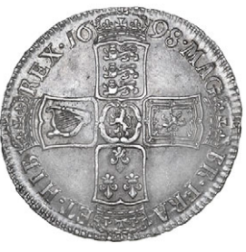
198 Halfcrown, 1698, edge DECIMO (ESC 554; S 3494). Obverse slightly weak, otherwise very fine or better, toned