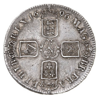
196 Crown, 1696, first bust, edge OCTAVO (ESC 87; S 3470). Better than very fine £200-250