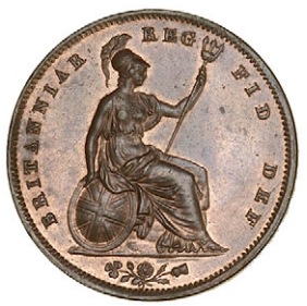
311 Penny, 1854, ornamental trident, no colons apart from a trace after BRITANNIAR (BMC 1507; S 3948). Extremely fine with much original colour £80-100