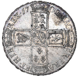
199 Halfcrown, 1700, edge DVODECIMO (ESC 561; S 3494). A few light surface marks, otherwise extremely fine or better £500-600