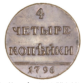
616 Catherine the Great, Novodel 4 Kopecks, 1796 (KM. N273). About extremely fine £300-350