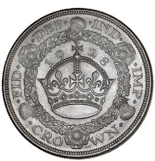
329 Crown, 1928 (ESC 368; S 4036). A couple of surface nicks, otherwise better than extremely fine £150-200