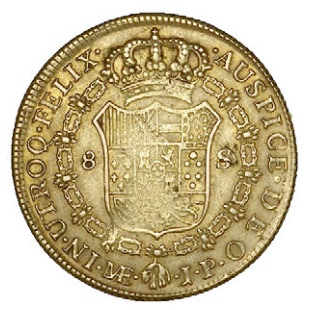
613 Ferdinand VII, 8 Escudos, 1817JP, Lima (Cayón 16466; KM. 129.1; F 54). Very fine £900-1,200