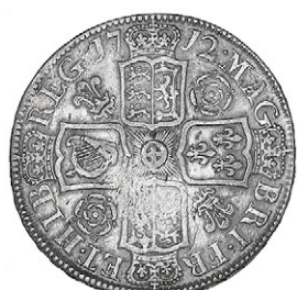
209 Halfcrown, 1712, roses and plumes, edge UNDECIMO (ESC 582; S 3607). Weak spot on reverse, otherwise nearly very fine £120-150