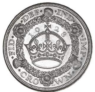
330 Crown, 1928 (ESC 368; S 4036). Of bright appearance, about extremely fine, reverse better £120-150