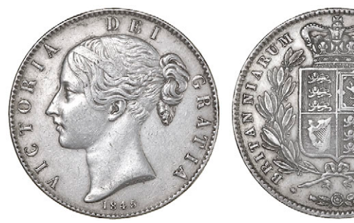
281 Crown, 1845, edge VIII, cinquefoil stops (ESC 282; S 3882). A few surface marks, otherwise better than very fine £150-200

280 Crown, 1844, edge VIII, star stops (ESC 280; $ 3882). Harshly cleaned at some time, otherwise nearly very fine £50-70