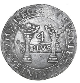
595 Carlos and Joanna , 4 Réales, P, Mexico City, 13.53g/12h (Cayón 3118). Slight double strike, otherwise very fine on a full round flan, very rare £400-600