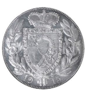
591 Johann II , 5 Kronen, 1915 (KM. Y4; Dav. 216). Good extremely fine with proof-like fields £120-150