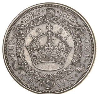
331 Crown, 1931 (ESC 371; S 4036). Dull appearance, otherwise good very fine £120-150