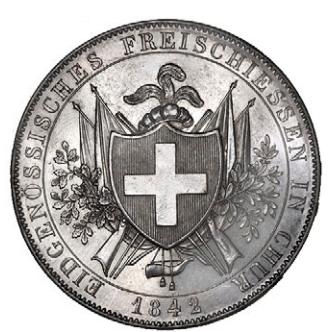
630 Graubünden, 4 Francs, 1842 (KM. 17; Dav. 372). Good extremely fine £400-600