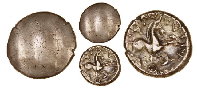
129 CANTII , Dubnovellaunus , Stater, blank with raised ridge in centre, rev . horse prancing right, bucranium above, serpent below, [DVBNOVELL]AVNOS around, 5.44g/11h (BMC 2492-6; VA 169; S 177). Very fine £700-900