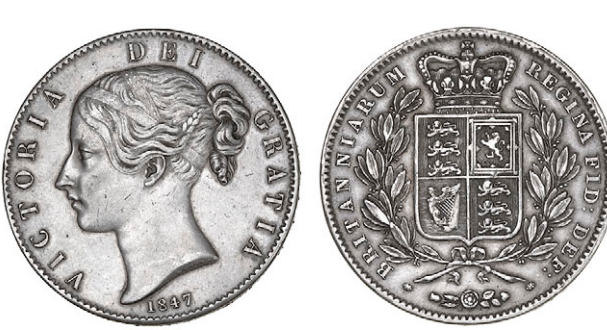
283 Crown, 1847, edge XI (ESC 286; S 3882). A few surface marks, otherwise about very fine £120-150

284 Crown, 1847, edge XI (ESC 286; S 3882). Some surface marks, otherwise about very fine £120-150