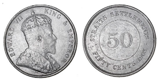
627 Edward VII, 50 Cents, 1903 (Prid. 31(b); KM. 23). A couple of light scratches and edge nicks, otherwise very fine or better, scarce