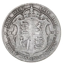
323 Halfcrown, 1905 (ESC 750; S 3980). Some edge nicks, fair, the date clear, rare £200-300