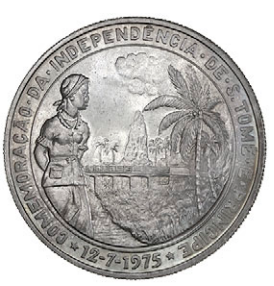
617 Democratic Republic, Pattern 250 Dobras, 1976, by M. Norte, in silver, eagle, rev. woman surveying landscape, edge grained, 16.59g/6h (KM. -). Brilliant and toned, extremely rare

The first coins for the Democratic Republic were not issued until 1977