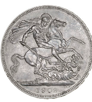
321 Proof Crown, 1902, edge II (ESC 362; S 3979). Matt, extremely fine £120-150

322 Proof Crown, 1902, edge II (ESC 362; S 3979). The matt surface removed due to cleaning, otherwise about extremely fine £60-80