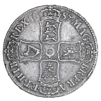
186 Crown, 1687, second bust, edge TERTIO (ESC 78; S 3407). Much surface haymarking, otherwise very fine or better £500-700