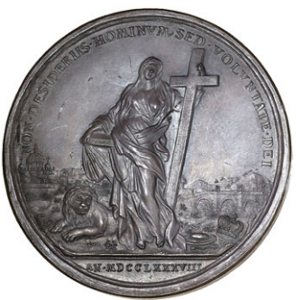
705 Death of Prince Charles, 1788, a bronze medal by G. Hamerani, bust of Cardinal York right, rev. figure of Religion with bible and cross, St Peter's in the background, 53mm (Woolf 73:1a; BHM 282). Extremely fine £250-350