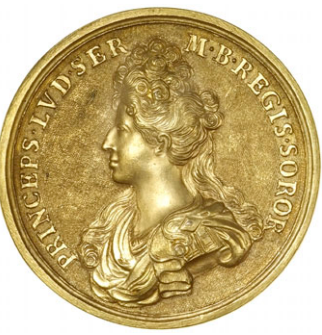
698 Death of Princess Louisa, 1712, a cast gilt-bronze medal by J. O'Brisset after N. Roettier, bust of James III left, rev. bust of Louisa left, 49mm (Woolf 28:2; MI II, 388/241; E 454b). Spot of gilding missing from James's cheek, otherwise about extremely fine, very rare