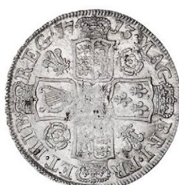
210 Halfcrown, 1713, roses and plumes, edge DVODECIMO (ESC 584; S 3607). Some surface marks, particularly on Queen's face, otherwise extremely fine with traces of mint bloom £450-550