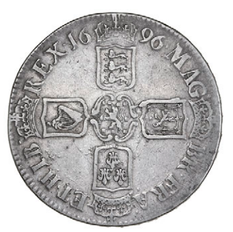
197 Crown, 1696, third bust, edge OCTAVO (ESC 94; S 3472). Good fine £80-100