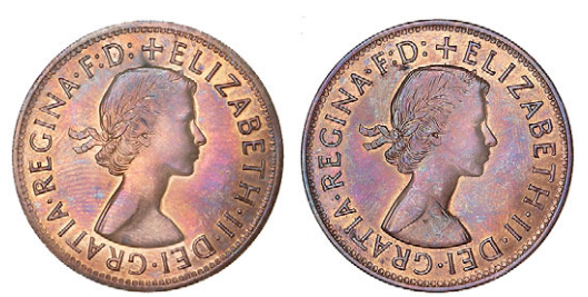
123 Elizabeth II [1961+, perhaps 1970] Proof, double-headed, 9.63g/12h. Brilliant, virtually as struck £50-100