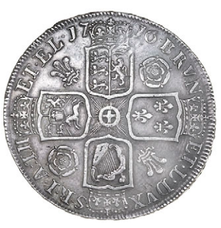
216 Crown, 1716, roses and plumes, edge SECVNDO (ESC 110; S 3639). A little blank filing, otherwise good very fine, darktoned