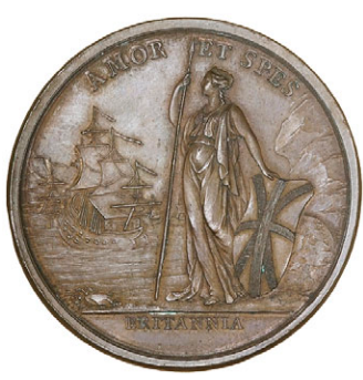
704 Treaty of Aix-La-Chapelle, 1748, a bronze medal, unsigned (by C.N. or J.C. Roettier), bust of Prince Charles right, rev. Britannia standing at the shore regarding the approaching fleet, 41mm (Woolf 59.2; MI II, 600/251; E 595a). Nearly extremely fine £200-250