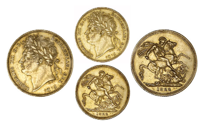
253 Sovereign, 1822 (M 6; S 3800). Some cuts on bust and legend at 7 o'clock, otherwise very fine £200-250