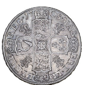
208 Halfcrown, 1708, plumes, edge SEPTIMO (ESC 578; S 3606). Nearly very fine, reverse better £150-200