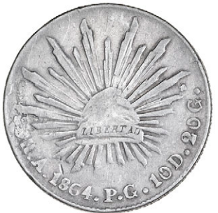
599 Republic , 8 Réales, 1864PG, Alamos (KM. 377). Probably removed from a mount, otherwise good fine, extremely rare £400-600