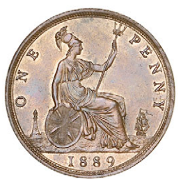
87 1889 , dies Rr, 15 leaves in wreath, normal date, 9.43g/12h (Gouby A; F 127 [dies 12+N]; Bamford 129; BMC 1741; S 3954). Extremely fine with considerable original colour and reflective fields £90-120

88 1889, dies Sr, 14 leaves in wreath, normal date, 9.59g/12h (Gouby C; F 128 [dies 13+N]; Bamford 131; BMC 1741A; S 3954). Extremely fine with a hint of original colour and reflective fields £60-80