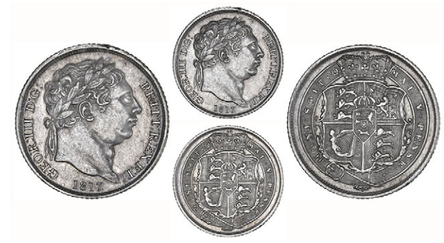
250 Sixpence 1817, N in HONI double punched (cf. ESC 1632; S 3791). Good very fine, extremely rare, the variety unpublished £80-100

249 Shillings (3), 1816, 1819, 1820 (ESC 1228, 1235, 1236; S 3790) [3]. First extremely fine, others almost as struck, all toned £150-200