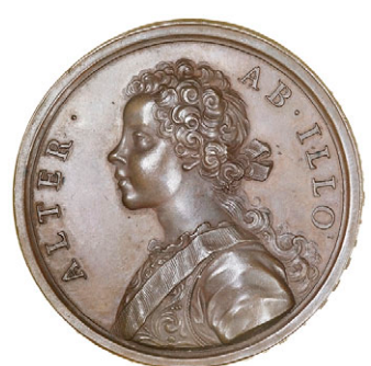
703 The Jacobite Princes, 1731, a bronze medal by O. Hamerani, bust of Prince Charles right, star in field, rev. bust of Prince Henry left, edge lettered, 41mm (Woolf 43.1; MI II, 492/32; E 521). About extremely fine £250-300