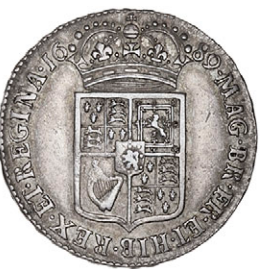
191 Halfcrown, 1689, second shield, no frosting or pearls, edge PRIMO (ESC 512; S 3435). About very fine, toned £120-150