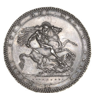
244 Crown, 1818, edge LIX (ESC 214; S 3787). Surfaces marked, otherwise extremely fine or better £150-200