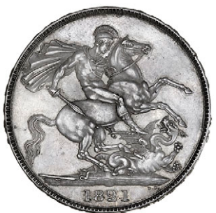
256 Crown, 1821, upright WWP, edge SECUNDO (ESC 246; S 3805). A couple of reverse edge nicks, otherwise nearly extremely fine £350-450

257 Crown 1821, edge SECUNDO; Halfcrowns (3), 1821, 1823 type 2, 1829; Shillings (3), 1821, 1824, 1825 type 3; Sixpences (3), 1821, 1824, 1826 type 3 ($ 3805, 3807-15) [10]. Mostly good fine or better £120-150