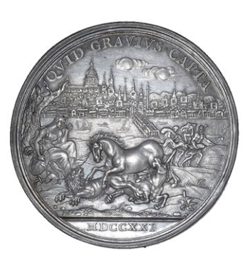
702 Appeal Against the House of Hanover, 1721, a silver medal by E Hamerani, bust of James III right, rev. Hanoverian horse trampling lion and unicorn, view of London behind, 49mm (Woolf 40:1; MI II, 454/63; E 493). A few light hairlines, otherwise extremely fine or better; in fitted shagreen case