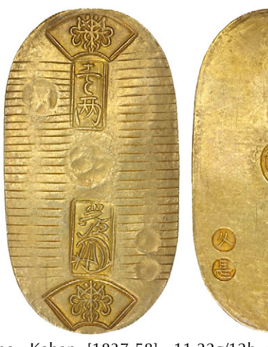
584 Tempo , Koban [1837-58], 11.22g/12h (J & V B107; KM. C22b; F 15). Very fine or better £500-700