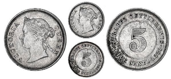
625 Victoria, 5 Cents, 1883 (Prid. 132; KM. 10). Nearly very fine, rare £150-200