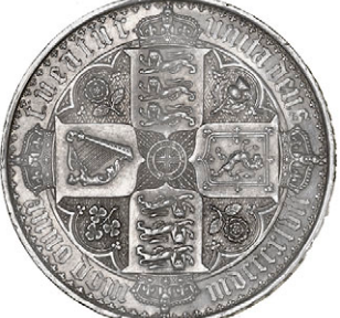
285 Crown, 1847, edge UNDECIMO (ESC 288; S 3883). A few tiny rim nicks and surface marks, otherwise almost extremely fine, attractively toned £600-800

286 Crown, 1887; Double Florin, 1887; Halfcrown 1889; Florin to Threepence, all 1887 (S 3921-2, 3924-6, 3928-9, 3931) [8]. Mostly extremely fine £90-120