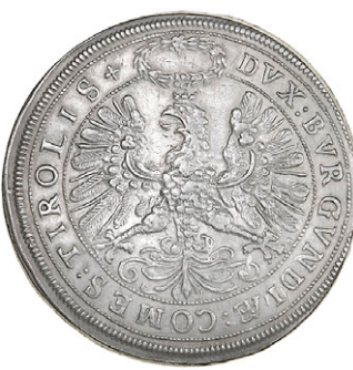
518 Archduke Leopold (1619-32), Double-Thaler, undated, Hall, on his marriage to Claudia de Medici, 56.93g/12h (KM. 641; Dav. 3332). Edge bruise at 2 o'clock, otherwise good very fine £400-500