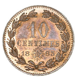
592 Ranavalona III , Pattern 10 Centimes, 1883, in bronze, unsigned, crown within floral wreath, rev. value, 9.83g/6h (VG 4; Bruce X1). About as struck with much original colour, rare £150-200