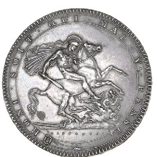
245 Crown, 1819, edge LIX (ESC 215; S 3787). Minor surface and rim marks, otherwise very fine, obverse better, toned £70-90