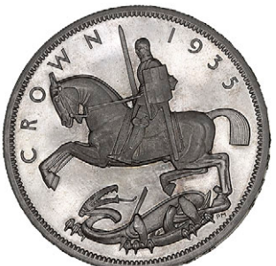
332 Proof Crown, 1935, edge XXV, 28.43g/12h (ESC 378; S 4050). Practically as struck, toned £250-300