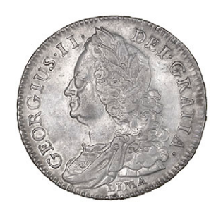
Provenance: Glendining Auction, 2 June 1994, lot 356