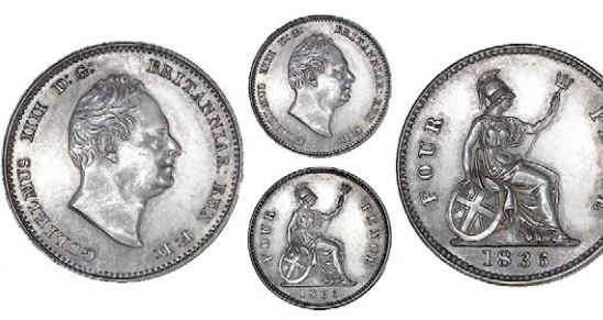
269 Proof Britannia Groat, 1836, edge plain, 1.90g/12h (ESC 1920; S 3837). Some hairlines, otherwise extremely fine, rare £250-350