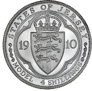
343 Unofficial INA retro series, George V , piédfort Four Shillings, 1910, in silver, bust left, rev . crowned shield, edge grained, 31.21g/12h ( cf. Bruce XM 3). Practically as struck, UNIQUE £120-150