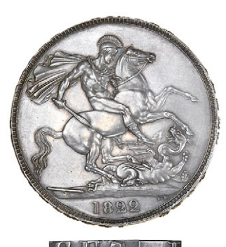
258 Crown, 1822, edge SECUNDO, A of ANNO mis-struck, S of DECUS over 8 [?] (cf. ESC 246; S 3805). Some light surface scratches on obverse, otherwise extremely fine, the edge £900-1,200 errors apparently unpublished