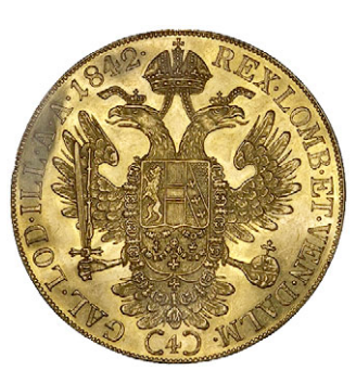
519 Ferdinand I , 4 Ducats, 1842A (KM. 2270; F 480). Creased and with a couple of edge nicks, otherwise extremely fine

520 Franz Joseph , 20 Kreuzer, 1852C (KM. 547.3). Very fine or better £60-80