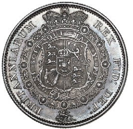
247 Halfcrown, 1816 (ESC 613; S 3788). Dig in field by shoulder, otherwise extremely fine, light olive tone £120-150