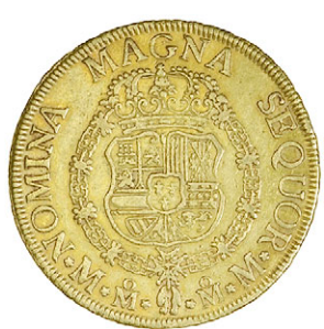
596 Charles III , 8 Escudos, 1760MM, Mexico City (Cayón 12736; KM. 153; F 25). Tiny edge flaw at 10 o'clock, otherwise about very fine, very rare £2,000-2,500