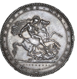
246 Crown, 1819, edge LX (ESC 216; S 3787). Reverse edge knock at 3 o'clock and some surface marks and scratches, otherwise nearly extremely fine £120-150