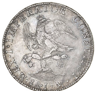
598 Augustin I Iturbide , 8 Réales, 1822JM, continuous legend, long smooth truncation (KM. 308). Obverse a little smooth, otherwise good fine £90-120