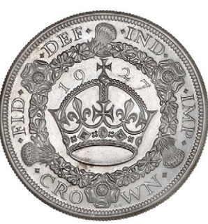
328 Proof Crown, 1927 (ESC 367; S 4036). Small stain on reverse, otherwise about as struck £120-150