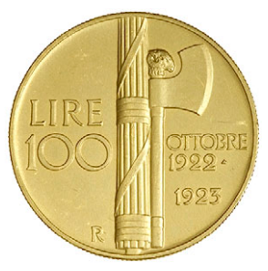
582 Victor Emanuel III , 100 Lire, 1923R (KM. 65; F 30). Some minor surface marks and scuffs to the matt finish, otherwise about as struck, very rare £1,500-2,000