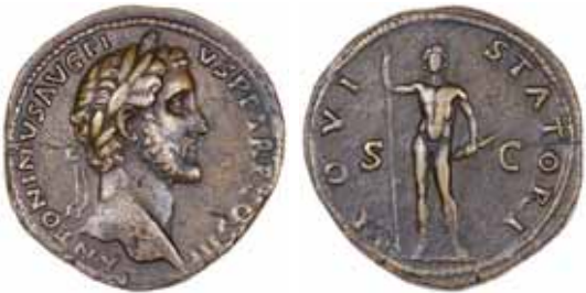
2287 Sestertius, 140-144, laureate head right, rev. IOVI STATORI, S-C, Jupiter standing facing, naked, holding sceptre and thunderbolt, 24.89g (RIC 607; C. 460). Brown tone, very fine £350-450