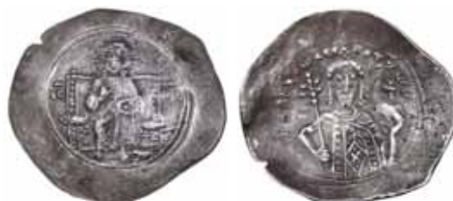
2781 Electrum Histamenon Nomisma, Constantinople, c. 1087-1092, facing bust of Christ Pantokrator, rev. crowned facing bust of Alexius, holding scepter surmounted by star and globus cruciger, 3.20g/6h (DOC 2b; Sear 1892). Good very fine £250-300