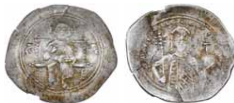
2782 Electrum Histamenon Nomisma, Constantinople, c. 1087-1092, facing bust of Christ Pantokrator, rev. crowned facing bust of Alexius, holding scepter surmounted by star and globus cruciger, 4.22g/6h (DOC 2b; Sear 1892). Very fine £250-300