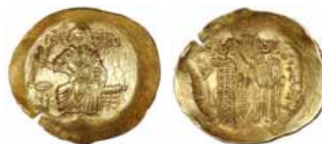
2783 Hyperpyron, Thessalonica c. 1122-113, Christ, nimbate, enthroned facing, raising hand in benediction and holding Gospels, rev. John standing facing, holding labarum and globus cruciger, being crowned by the Virgin Mary, 4.61g/6h (DOC IV 5; Sear 1948). Extremely fine £200-250