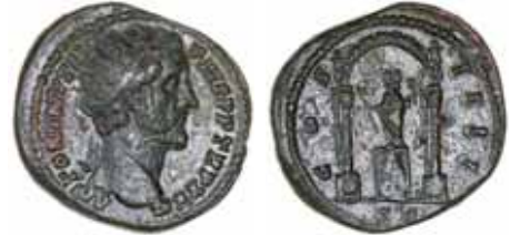
2300 Dupondius, 158-159, radiate head right, rev. distyle shrine containing statue (of the Genius of the Roman Senate?), 13.45g (RIC 1014; C. 334). Scarce, smooth dark green patina, good very fine £160-220 Provenance: Bt. D. Miller 1997