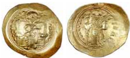
2777 Histamenon Nomisma, Constantinople, Christ Pantokrator enthroned facing, rev. Constantine standing facing, holding labarum and globus cruciger, 4.37g/6h (DOC 1a; Sear 1847). Good very fine £200-250