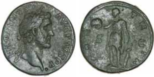
2286 Sestertius, 139, laureate head right, rev. PARTHIA, S-C, Parthia standing left, holding crown and bow and quiver resting on ground, 27.09g (RIC 586; C. 572). About very fine, rare £200-300

Provenance: Vecchi Auction, Lot 800, 4/9/1998