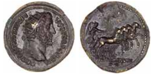
2299 Dupondius, 140-144, radiate head right, rev. VICTORIA AVG / S C, Victory driving fast quadriga right, 11.47g (RIC 674; C. 1084). Scarce, good very fine £150-200