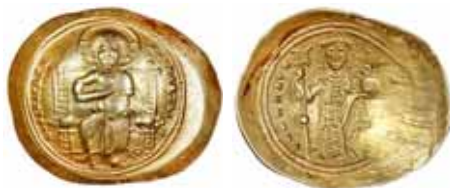
2779 Histamenon Nomisma, Constantinople, Christ Pantokrator enthroned facing, rev. Constantine standing facing, holding labarum and globus cruciger, 4.31g/5h (DOC 1a; Sear 1847). Good very fine £200-250