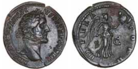
2291 Sestertius, 143-144, laureate head right, rev. IMPERATOR II, S-C, Victory flying right, holding trophy, 22.35g (RIC 717a; C. 433), refers to victory in Britain. Graze on jaw under green patina, good very fine £200-300