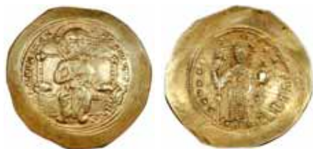
2776 Histamenon Nomisma, Constantinople, Christ Pantokrator enthroned facing, rev. Constantine standing facing, holding labarum and globus cruciger, 4.40g/6h (DOC 1a; Sear 1847). Good very fine £200-250