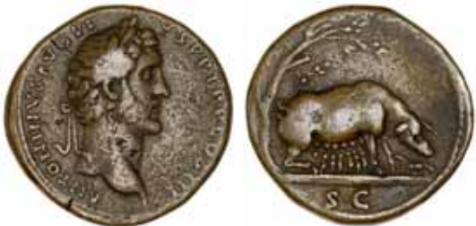
2288 Sestertius, 140-144, laureate head right, rev. the Great Sow standing right under holm-oak, suckling seven piglets, 24.46g (RIC 629; C. 775). A splendidly realised sow, scarce, an appealing brown tone and good fine to almost very fine £300-400