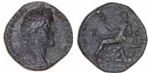
2292 Sestertius, 143-144, laureate head right, rev. BRITANNIA, S C, Britannia seated left on rock, holding standard and leaning on shield set on helmet, a spear behind, 23.85g (RIC 745; C. 119). Untouched and unusually complete, good fine, very rare £700-800