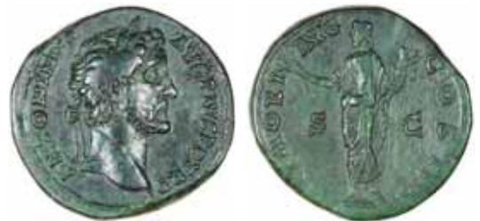
2293 Sestertius, 145-161, laureate head right, rev. Honos standing left, holding branch and cornucopiae, 27.41g (RIC 772; C. 414). Scarce, green patina, almost very fine £90-120