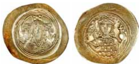
2780 Histamenon Nomisma, Constantinople, bust of Christ Pantokrator facing; barred IC XC across field, rev. crowned half-length bust of Michael facing, wearing loros, holding labarum and globus cruciger, 4.41g/6 (DOC 2c; Sear 1868). Sharp extremely fine £250-300