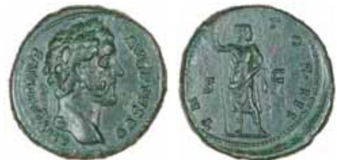
2302 As, 140-144, laureate head right, rev. Janus standing "facing", 12.96g (RIC 693a; C. 882). Scarce, green patina, good very fine £250-300 Provenance: CNG Auction 84, Lot 1028 5/5/2010, Ex. Bitner Collection