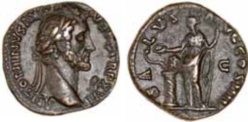
2295 Sestertius, 152-153, laureate head right, rev. Salus standing left, feeding snake coiled round altar from patera and holding sceptre, 24.64g (RIC 906; C. 732). Good very fine £250-350 Provenance: Bt. G. Monk 1990