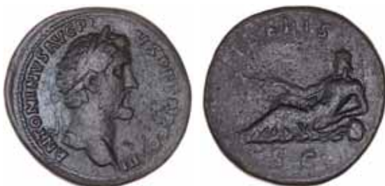
2289 Sestertius, 140-144, laureate head right, rev. TIBERIS, S C, Tiberis reclining left, hand resting on boat, leaning on upturned urn, 26.29g (RIC 642a; C. 819). Good fine, rare £90-120