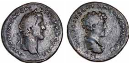
2298 Sestertius, 140-144, laureate head right, rev. bare-headed, draped and cuirassed bust of young Marcus right, 25.79g (RIC 1212; C. 34). Scarce, good fine £100-150