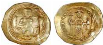
2778 Histamenon Nomisma, Constantinople, Christ Pantokrator enthroned facing, rev. Constantine standing facing, holding labarum and globus cruciger, 4.33g/6h (DOC 1a; Sear 1847). Good very fine £200-250