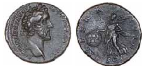
2303 As, 143-144, laureate head right, rev. IMPERATOR II, S C, Victory flying left, holding shield inscribed BRI / TAN, 10.94g (RIC 732; C. 442). Scarce, very fine £200-300