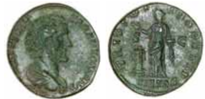
2301 As, as Caesar, 138, bare-headed, draped bust right, rev. PIETAS in ex., Pietas standing left, sacrificing over altar and holding box of incense, 11.79g (RIC ??). Attractive, natural apple-green patina, good very fine £150-200