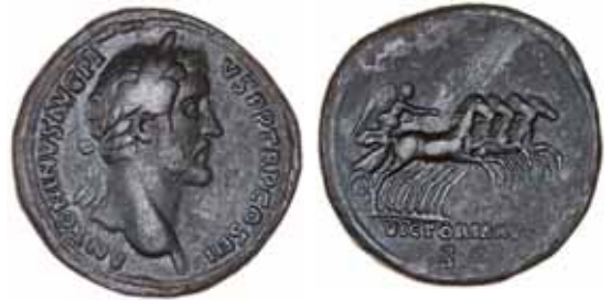
2290 Sestertius, 140-144, laureate head right, rev. VICTORIA AVG / S C in ex., Victory driving fast quadriga right, 26.14g (RIC 653; C. 1082). Some smoothing, almost very fine £200-300

Provenance: Vecchi Auction, Lot 800, 4/9/1998