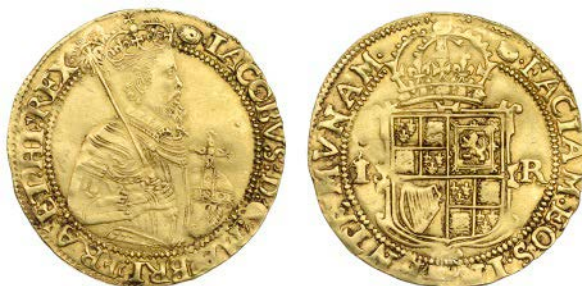
2202 Second coinage, Unite, mm. tun, fifth bust, 9.86g/11h (SCBI Schneider –; N 2085; S 2620). Skilfully plugged and re-engraved by the sceptre-head, a few surface marks, otherwise good very fine with a strong portrait £800-1,000