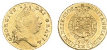
2611 Half-Guinea, 1801, sixth bust (MCE 439; S 3736). Some surface marks, otherwise extremely fine £300-350