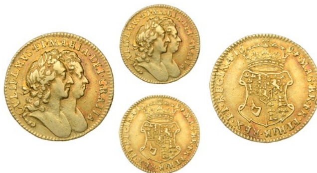
2533 Half-Guinea, 1694 (MCE 168; S 3430). Very fine with reddish tone