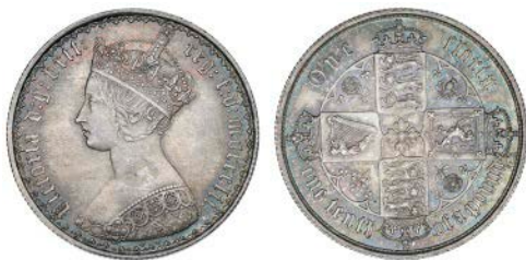
2715 Florin, 1852 (ESC 806; S 3891). Better than extremely fine, lightly toned