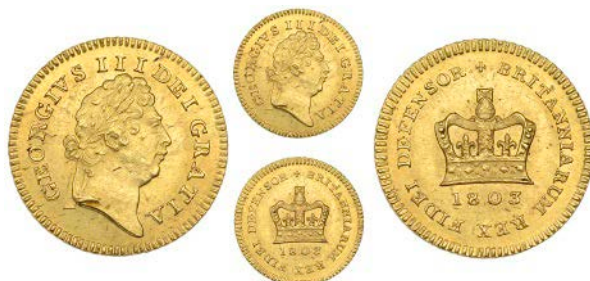
2614 Third-Guinea, 1803, first bust (MCE 455; S 3739). Good extremely fine £400-500