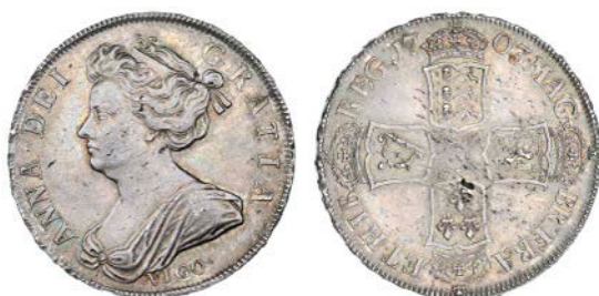
2566 Halfcrown, 1703 VIGO , edge TERTIO (ESC 569; S 3580). Minimal haymarking, otherwise extremely fine or better, attractively toned, rare £1,200-1,500

Provenance: DNW Auction 90, 9 December 2010, lot 541