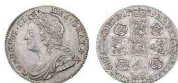
2599 Sixpence, 1739, roses, o of GEORGIVS over R (ESC 1612A; S 3708). Nearly extremely fine, lightly toned, the variety rare