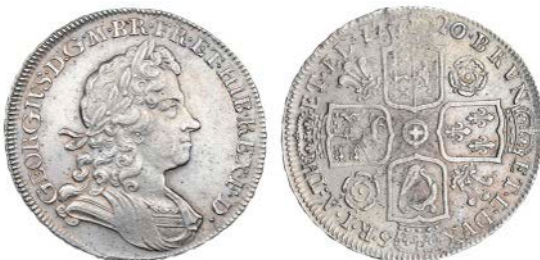
2579 Halfcrown, 1720/17, roses and plumes, edge SEXTO (ESC 590; S 3642). Some light haymarking, otherwise nearly extremely fine