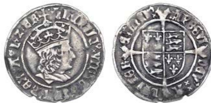
2180 First coinage, Groat, Tower, mm. castle, 2.71g/12h (N 1762; S 2316). Nearly very fine £120-150