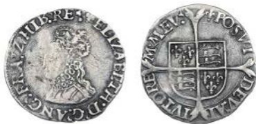
2196 First issue, Groat, mm. lis, wire-line inner circles, legend ends RE', bust 1F, 1.97g/3h (N 1986; S 2550). Flat on face, otherwise good fine or better, scarce £100-150