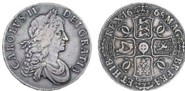
2509 Crown, 1668, second bust, edge VICESIMO (ESC 36; S 3357). Very fine