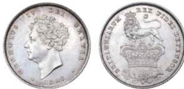
2782 1826 (Davies 232; ESC 1257; S 3812). Good extremely fine, reverse better, toned