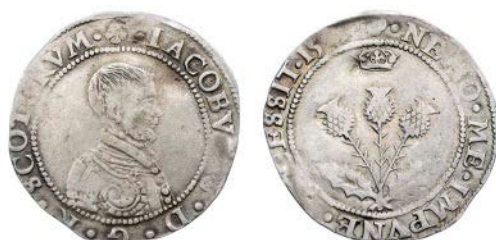
2215 James VI (1567-1625), Seventh coinage, Ten Shillings, 1593, mm. quatrefoil, 5.92g/1h (SCBI 35, 1255; B 1; S 5493). Small dent on reverse, otherwise good fine or better £150-200