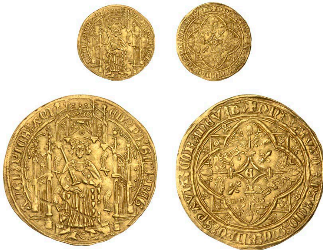
2376 Pavillon d'or, second issue, Bordeaux, Prince standing holding sword beneath ornate portico, feathers at sides, lions at feet, rev. ornate cross, lis and leopards in angles, mint-letter at end of legend, 4.72g/4h (Elias 154c). About extremely fine on a full round flan, rare £12,000-15,000

Provenance: Münzen und Medaillen Auktion 95 (Basle), 4-5 October 2004, lot 439