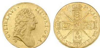
2546 Guinea, 1695, first bust (MCE 174; S 3458). Good very fine or better but retaining some peripheral brilliance £1,200-1,500