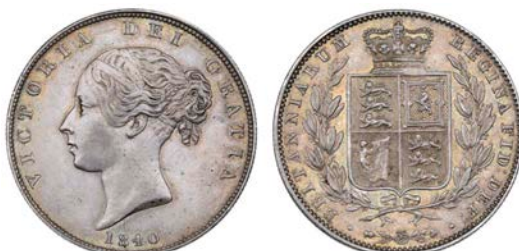
2710 Halfcrown, 1840 (ESC 673; S 3887). Nearly extremely fine, lightly toned