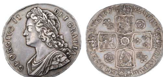
2587 Crown, 1732, roses and plumes, edge SEXTO (ESC 117; S 3686). A few edge knocks and marks, otherwise good very fine £800-1,000