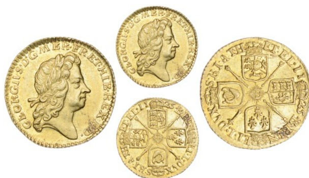
2572 Half-Guinea, 1725, second bust (MCE 274; S 3637). Extremely fine or better £1,200-1,500