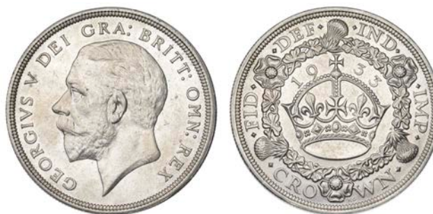
2754 Crown, 1933 (ESC 373; S 4036). A few minor surface marks, otherwise good extremely fine