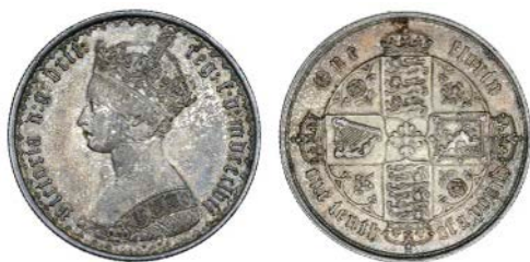
2718 Florin, 1857 (ESC 814; S 3891). Extremely fine