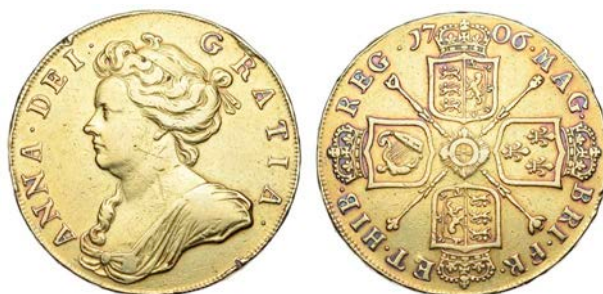
2558 Five Guineas, 1706, edge QUINTO (MCE 199; S 3560). Edge knocks and bruises, other surface marks, nearly very fine