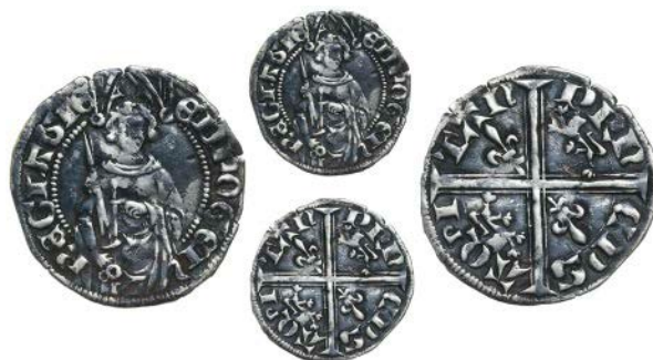
2378 Hardi d'argent, Poitiers, rev. mint-letter between q and i, lis in first angle of cross (Elias 205b). Nearly very fine £120-150