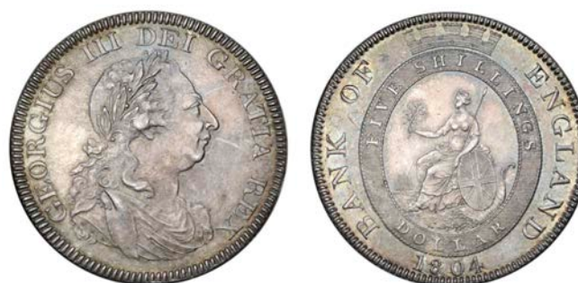
2634 Dollar, 1804, types E/2, no stop after REX (ESC 164; S 3768). Good extremely fine, lightly toned