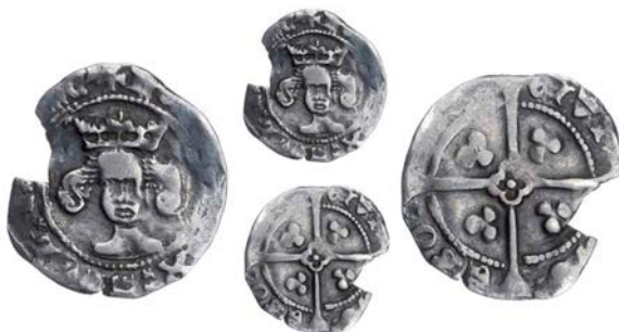
2157 Heavy coinage, Penny, York, mm. cross pattée on obv. only, 1.08g/11h (Delmé-Radcliffe 76, same rev. die; N 1351; S 1722). Chipped, otherwise good fine or better, very rare £500-600