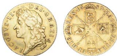
2527 Guinea, 1687, second bust (MCE 128; S 3402). Good fine or better but slightly buckled