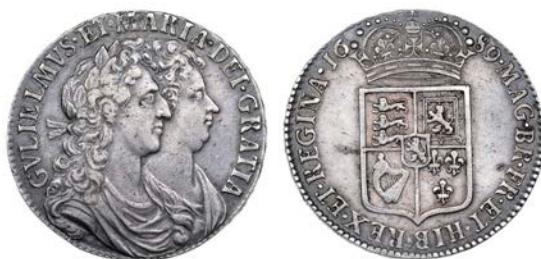
2535 Halfcrown, 1689, first shield, caul only frosted, pearls, edge PRIMO (ESC 505; S 3434). Some light haymarking and surface marks, otherwise better than very fine, toned £400-450