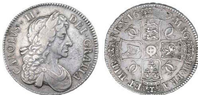
2514 Crown, 1679, fourth bust, edge TRICESIMO PRIMO (ESC 57; S 3359). Bold very fine, toned