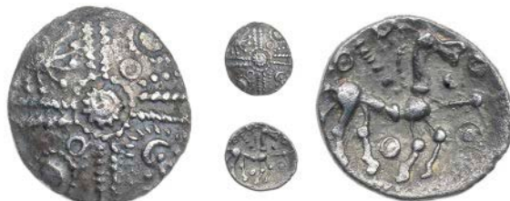
2390 Uninscribed issues, Half-Unit, cruciform wreaths, pellet-ring in centre, rings and spirals in angles, rev. pelleted horse right, pellets-in-annulets around, 0.48g/1h (ABC -; BMC -; VA -; S -). Good fine, reverse better, apparently UNIQUE £800-1,000

The cruciform obverse design bears more than a passing resemblance to some of the Danebury coins