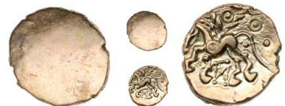
2401 Uninscribed issues, Quarter-Stater, Late Weald type, similar, 1.38g (ABC 198; BMC 2469-70; VA 151; S 172). Slightly off-centre, otherwise very fine £200-250