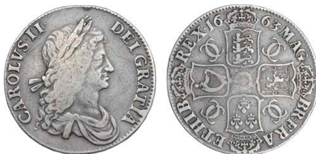
2505 Crown, 1663, first bust, edge xv (ESC 22; S 3354). Good fine £180-220