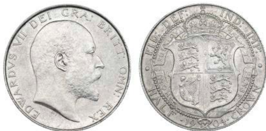
2740 Halfcrown, 1904 (ESC 749; S 3980). Minor surface marks, otherwise extremely fine or better, very rare