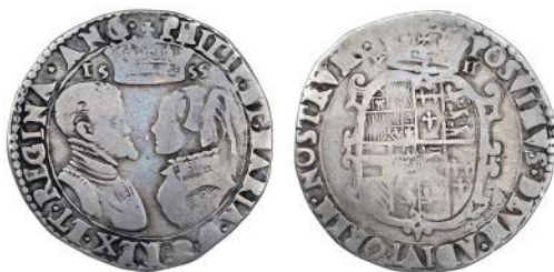
2194 Shilling, 1555, English titles and mark of value, reads REGINA ANG, 5.82g/8h (N 1968; S 2501). Fine or better £350-450