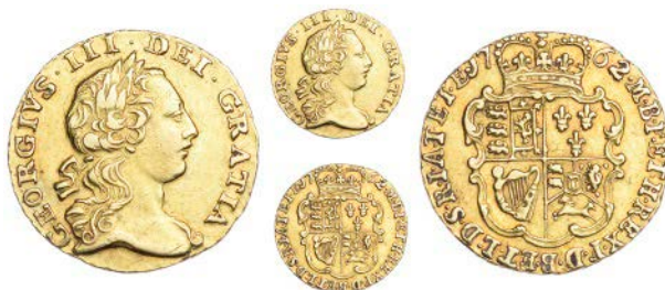
2618 Quarter-Guinea, 1762 (MCE 463; S 3741). Better than very fine