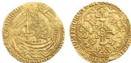
2161 Noble, class C, mm. pierced cross on rev. only, similar, 6.93g/5h (SCBI Schneider 225ff; N 1371; S 1742). A little small of flan, part of obverse legend slightly double-struck, otherwise very fine or better £1,200-1,500