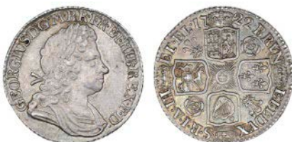
2583 Shilling, 1722, roses and plumes (ESC 1174; S 3645). Tiny mark on nose, otherwise very fine or better, toned