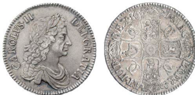
2511 Crown, 1671, third bust, edge VICESIMO TERTIO (ESC 43; S 3358). Good very fine, toned