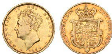
2653 Sovereign, 1830 (M 15; S 3801). Nearly very fine