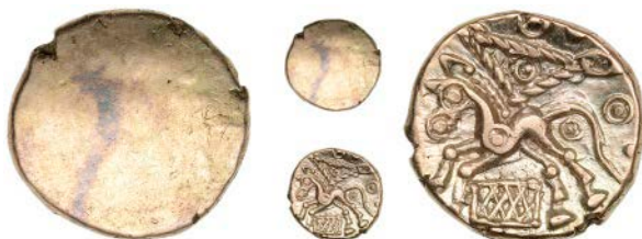
2395 Uninscribed issues, Quarter-Stater, Late Weald type, similar, 1.36g (ABC 198; BMC 2469-70; VA 151; S 172). Good very fine and well centred £250-300