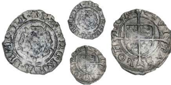
2473 Base Penny, mm. halved-rose-and-castle on obv. only, 0.64g/1h (N 1976; S 2510A). Very fine or better for issue, rare £100-150