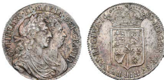
2534 Halfcrown, 1689, first shield, caul only frosted, pearls, edge PRIMO (ESC 505; S 3434). Better than extremely fine with mottled tone, rare £1,200-1,500