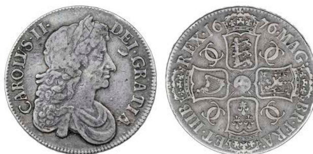
2512 Crown, 1676, third bust, edge VICESIMO OCTAVO (ESC 51; S 3358). Die flaw in obverse field below DEI, very fine, dark tone