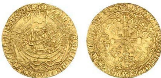
2160 Noble, class C, mm. pierced cross on rev. only, mullet by wrist, broken annulet on ship's side, nothing on rudder, rev. quatrefoil in second quarter, 6.92g/9h (SCBI Schneider 225ff; N 1371; S 1742). King's face rather flat, otherwise good very fine £1,500-1,800