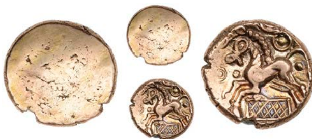
2391 Uninscribed issues, Stater, Late Weald type, blank, rev. horse left, pellet-in-annulet above, lattice-work box below, pellets and annulets around, 5.57g (ABC 177; BMC 2466; VA 144; S 169). Nearly extremely fine, extremely rare £1,200-1,500