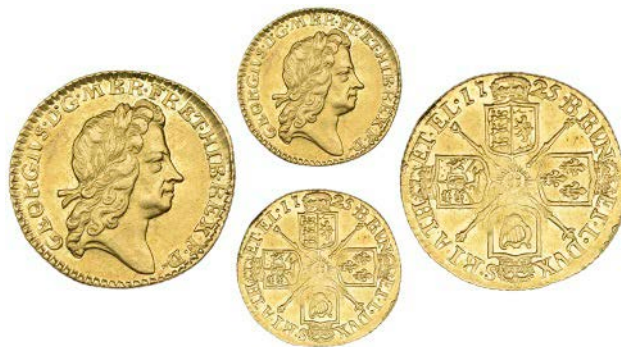
2573 Half-Guinea, 1725, second bust (MCE 274; S 3637). Very slightly bent, otherwise extremely fine or better £900-1,200