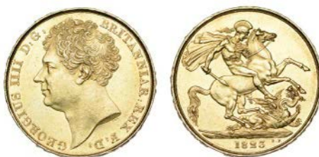
2652 Two Pounds, 1823, edge iv (S 3798). Minor surface marks and hairlines in fields, otherwise extremely fine or better and retaining some brilliance