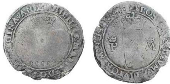
2217 Philip and Mary , Shilling, 1555, mm. portcullis on rev. only, reads AN, 7.96g/1h (S 6500; DF 232). Edge a little ragged, fair to fine £100-150