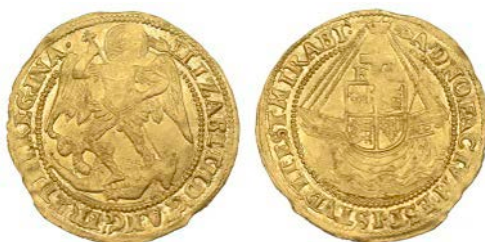
2476 Sixth issue, Angel, mm. hand, 5.17g/12h (Brown/Comber C39; SCBI Schneider 790; N 2005; S 2531). A little weak in places, otherwise nearly extremely fine, probably much as struck, scarce £4,000-4,500