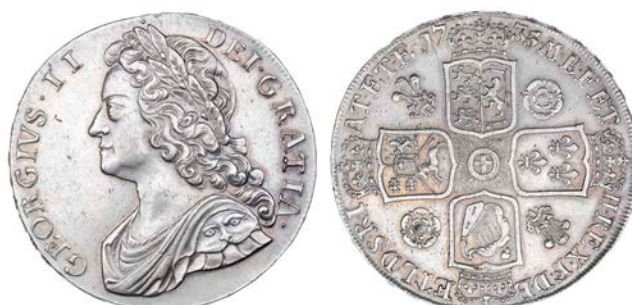
2588 Crown, 1735, roses and plumes, edge OCTAVO (ESC 120; S 3686). About extremely fine £1,400-1,800