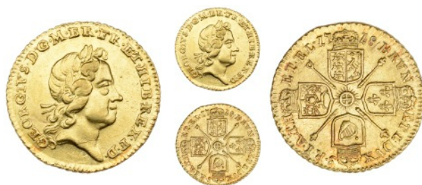
2574 Quarter-Guinea, 1718 (MCE 277; S 3638). Light surface marks, otherwise extremely fine, brilliant £400-500