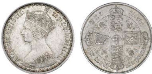
2717 Florin, 1853, no stop after date (ESC 808; S 3891). Extremely fine or better