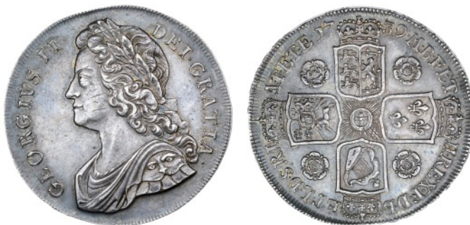
2589 Crown, 1739, roses, edge DVODECIMO (ESC 122; S 3687). Lightly marked on face, otherwise good extremely fine, toned £1,800-2,000