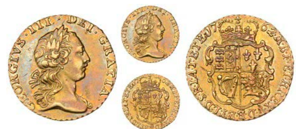
2617 Quarter-Guinea, 1762 (MCE 463; S 3741). Scratched in reverse field, otherwise extremely fine, toned £250-300