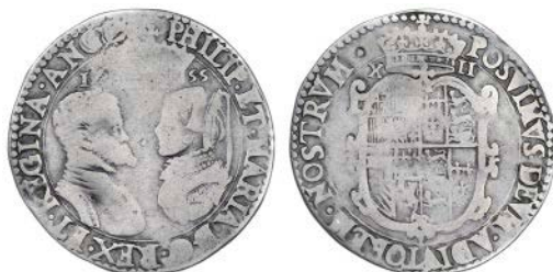
2195 Shilling, 1555, English titles and mark of value, reads REGINA ANG, 5.68g/2h (N 1968; S 2501). Lightly creased, fine or better £300-400