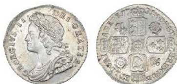
2598 Sixpence, 1731, roses and plumes (ESC 1607; S 3707). Light surface marks, otherwise good very fine