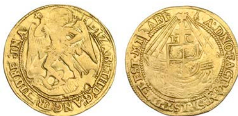
2198 Fifth issue, Angel, mm. sword, 4.92g/5h (Brown/Comber C20; SCBI Schneider 769; N 1991/1; S 2525). Better than fine £1,800-2,200