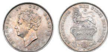
2783 1827 (Davies 234; ESC 1259; S 3812). Minor marks, otherwise extremely fine and toned, rare