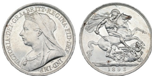
2707 Crown, 1893, dies 1+A, edge LVI (ESC 303; S 3937). Some bagmarking, otherwise better than extremely fine £180-220