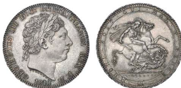
2644 Crown, 1818, edge LIX (ESC 214; S 3787). Practically as struck, toned