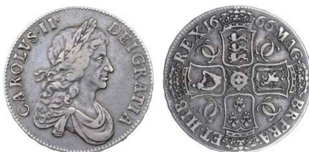
2507 Crown, 1666, second bust, edge xviii (ESC 32; S 3355). Better than very fine, toned, rare £1,000-1,200