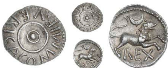
2389 Verica, Unit, VERICA COMMI F around pellet in annulet, rev. lion right, crescent above, REX below, 1.31g/11h (ABC 1229; BMC 1332ff; VA 505; S 132). Good very fine or better £250-300