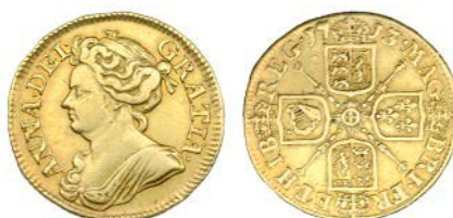
2559 Guinea, 1713, third bust (MCE 225; S 3574). Nearly very fine, reverse good fine