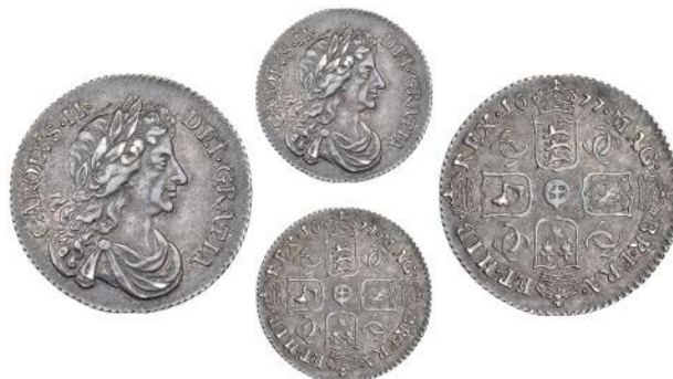
2522 Sixpence, 1677 (ESC 1516; S 3382). Nearly extremely fine £350-400