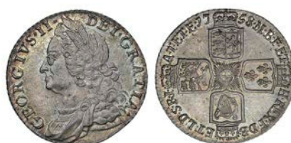
2597 Shilling, 1758 (ESC 1213; S 3704). Practically as struck