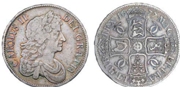
2513 Crown, 1677/6, third bust, edge VICESIMO NONO (ESC 53; S 3358). A few light surface marks on obverse, otherwise good fine, reverse better, toned, rare