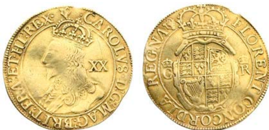
2208 Tower mint, Unite, Gp D, class I, mm. harp, 8.86g/11h (SCBI Schneider 145; SCBI Brooker –; N 2152; S 2691). Possibly with suspension ring removed at 12 o'clock, slightly creased, portrait about fine, legends and reverse better £500-700