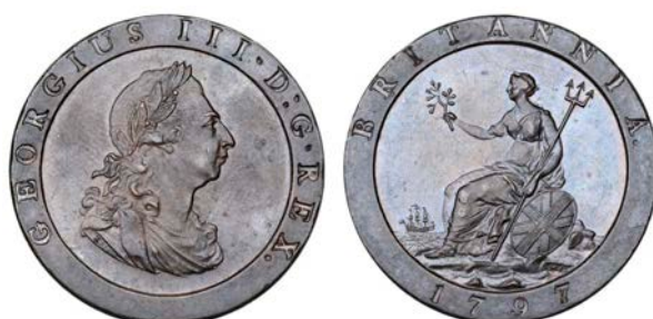
2624 Penny, 1797, 10 leaves (BMC 1132; S 3777). Extremely fine