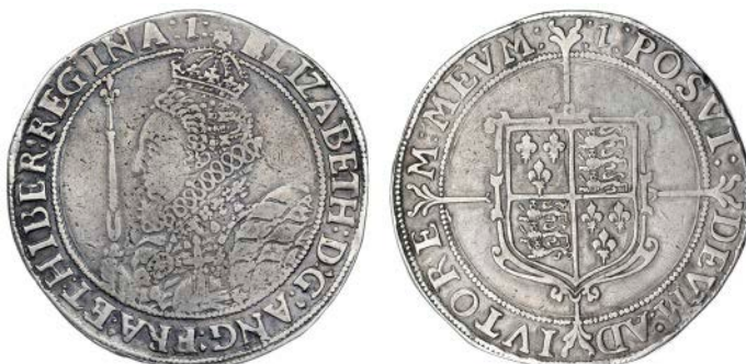
2199 Seventh issue, Crown, mm. 1, sceptre points to I of REGINA, 29.88g/6h (FRC D-6 [Sale, Lot 12]; N 2012; S 2582). Light scratch on profile, otherwise good fine £3,000-3,500