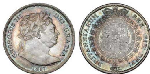
2645 Halfcrown, 1817, large head (ESC 616; S 3788). Practically as struck