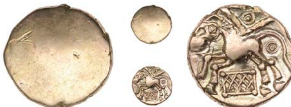
2399 Uninscribed issues, Quarter-Stater, Late Weald type, similar, 1.36g (ABC 198; BMC 2469-70; VA 151; S 172). Very fine or better £200-250