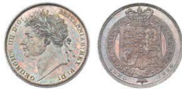
2778 1824 (Davies 221; ESC 1251; S 3811). Almost as struck, superb tone