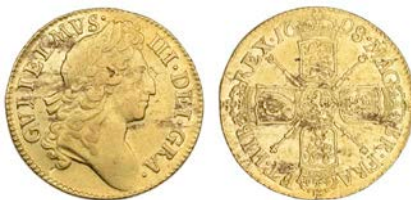
2548 Guinea, 1698, normal date figures and lettering (MCE 179; S 3460). Some haymarking both sides, otherwise very fine or better £1,200-1,500