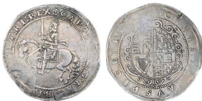
2210 Truro mint, Crown, mm. rose, 29.68g/5h (Besly A1; SCBI Brooker 1008-9, same dies; N 2531; S 3045). A little flat in places, otherwise very fine or better, toned £700-900