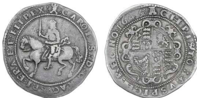
2212 Exeter mint, Crown, 1645, mm. castle, 29.25g/11h (Besly D22; SCBI Brooker 1043; N 2561; S 3062). Good fine or better £600-800