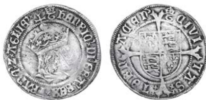
2184 First coinage, Groat, Tournai, mm. crowned cursive T, CIVITAS TORNACEN', 2.72g/10h (N –; S 2317). Slightly bent and face flat, otherwise good fine, very rare £800-1,000