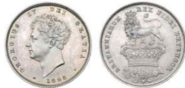
2781 1825 Proof , type 3, edge grained, 5.64g/6h (Davies 230P; ESC 1255; S 3812). Light hairlines, good extremely fine, toned