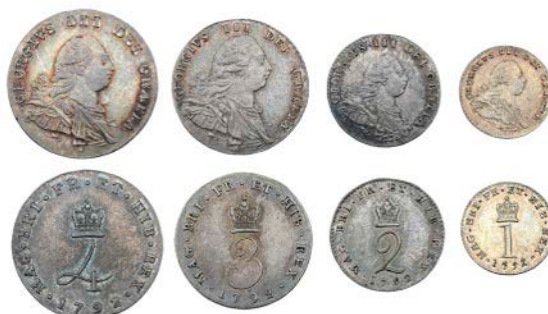
2622 Maundy set, 1792 (ESC 2419; S 3763) [4]. Good very fine