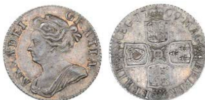
2570 Shilling, 1709, third bust (ESC 1154; S 3610). Nearly extremely fine, toned £300-350