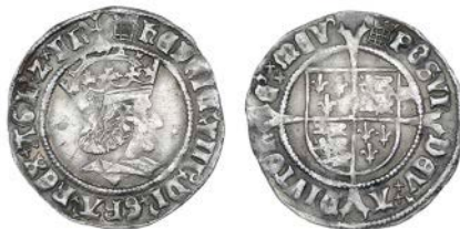
2182 First coinage, Groat, Tower, mm. crowned portcullis (without chains on rev. ), 2.86g/1h (N 1762; S 2316). Scratch on hair and face a little weak, otherwise very fine or better £350-400