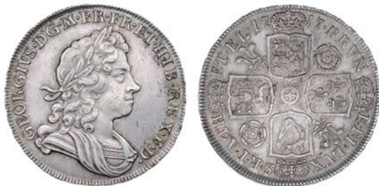
2578 Halfcrown, 1717, roses and plumes, edge TIRTIQ (ESC 589; S 3642). About extremely fine