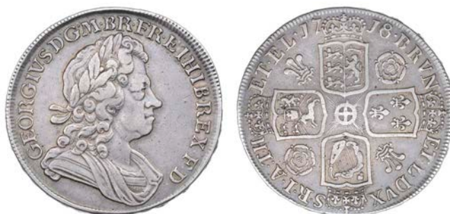
2575 Crown, 1718/6, roses and plumes, edge QVINTO (ESC 111A; S 3639). Better than very fine, toned £1,200-1,500