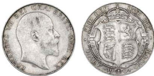
2741 Halfcrown, 1904 (ESC 749; S 3980). Nearly very fine