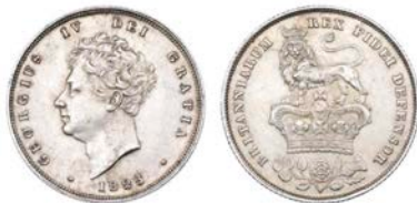
2780 1825 , type 3 (Davies 230; ESC 1254; S 3812). Good very fine