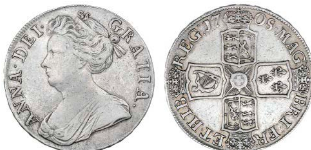
2564 Crown, 1708, second bust, edge SEPTIMO (ESC 105; S 3601). Nearly very fine £350-450

ESC does not give this edge reading for the date, though it does list the 1708/7 overdate. The only main reference to list it is Coincraft's Standard Catalogue of English and UK Coins (ANCR-030)