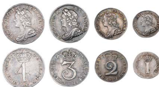
2601 Maundy set, 1746 (ESC 2410; S 3716) [4]. Threepence with small dig before King's neck, otherwise very fine or better