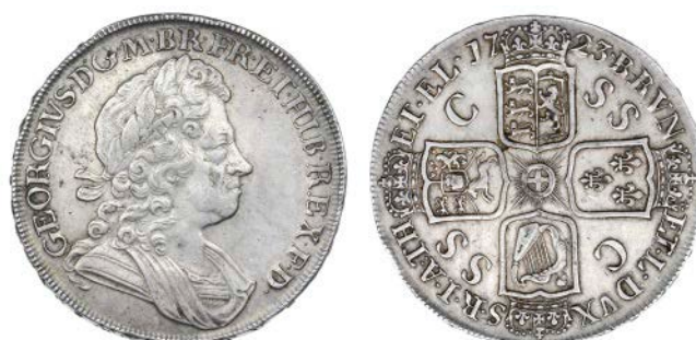
2577 Crown, 1723, SSC, edge DECIMO (ESC 114; S 3640). A few surface marks and scratches, otherwise good very fine or better £1,500-1,800

The edge on this coin appears to have been applied twice, the first reading DECVS ET TVTAMEN ANNO...SE; the second, inverted, reads TVTA...ITO. The rest of the coin however shows no sign of over-striking or double-striking