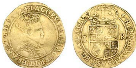
2203 Second coinage, Double Crown, mm. lis, third bust, 4.64g/5h (SCBI Schneider –; N 2086; S 2621). A little creased, otherwise about fine, reverse better £400-500