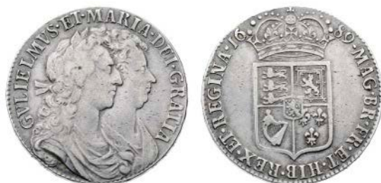
2536 Halfcrown, 1689, first shield, caul only frosted, pearls, edge PRIMO (ESC 505; S 3434). Nearly very fine