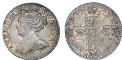
2568 Shilling, 1707, third bust (ESC 1141; S 3610). Extremely fine or better, toned £200-250