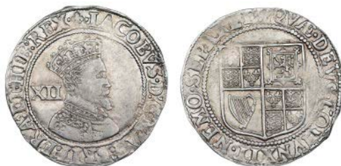
2204 Second coinage, Shilling, mm. lis, third bust, 5.96g/8h (N 2099; S 2654). Very fine or better £200-250