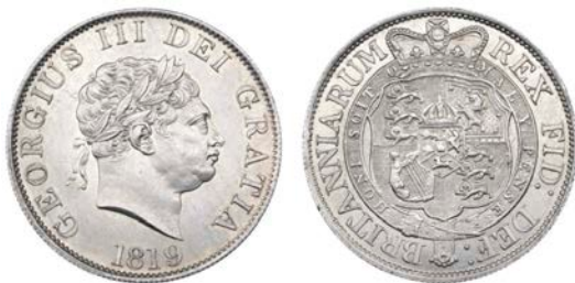
2647 Halfcrown, 1819 (ESC 623; S 3789). Practically as struck