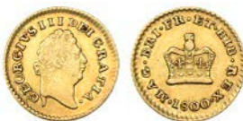
2613 Third-Guinea, 1800, first bust (MCE 452; S 3738). Very fine £90-120