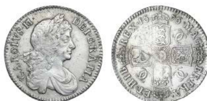
2520 Shilling, 1676, second bust (ESC 1047; S 3375). Minor die breaks both sides, good fine or better