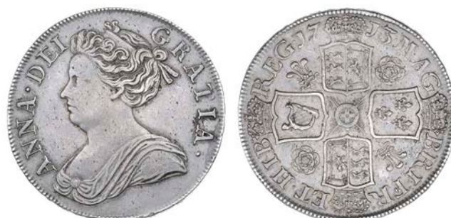
2565 Crown, 1713, roses and plumes, edge DVODECIMO (ESC 109; S 3603). Some surface flecking, otherwise good very fine, reverse better, toned £800-1,000

Provenance: DNW Auction 90, 9 December 2010, lot 541