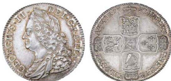
2594 Halfcrown, 1750, edge VICESIMO QUARTO (ESC 609; S 3696). Extremely fine or better £1,800-2,000