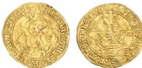
2176 First coinage, Angel, mm. castle (with pellet on obv. ), saltire stops, 4.90g/5h (SCBI Schneider 558; N 1760; S 2265). A little creased and with small score on obverse, otherwise nearly very fine £700-900