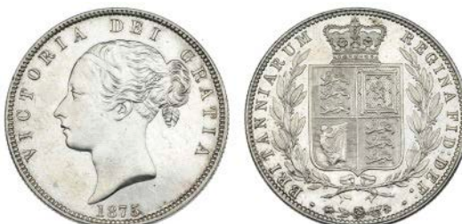
2711 Halfcrown, 1875 (ESC 696; S 3889). Better than extremely fine with proof-like fields