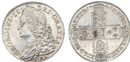
2593 Halfcrown, 1746 LIMA, edge DECIMO NONO (ESC 606; S 3695A). Extremely fine or better £400-500