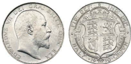
2743 Halfcrown, 1910 (ESC 755; S 3980). A few surface marks, otherwise practically as struck