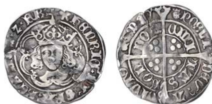
2173 Facing Bust issue, Groat, class IIIc, mm. pansy on obv. , leopard's head crowned on rev. , 2.95g/8h (SCBI Ashmolean 330; N 1705c; S 2199). Good fine, the combination of marks rare £100-150