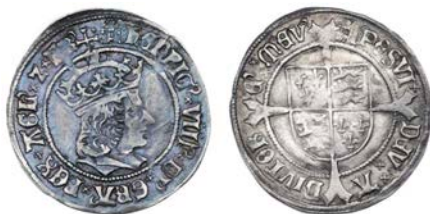
2181 First coinage, Groat, Tower, mm. castle (with pellet on obv. ), 2.82g/1h (N 1762; S 2316). Slightly creased, otherwise about very fine £150-200