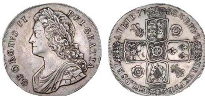
2586 Crown, 1732, roses and plumes, edge SEXTO (ESC 117; S 3686). Obverse edge bruises (flaws?), otherwise good very fine, reverse better £1,200-1,500