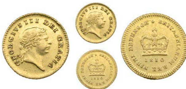
2615 Third-Guinea, 1810, second bust (MCE 460; S 3740). Some surface marks, otherwise better than very fine £300-350