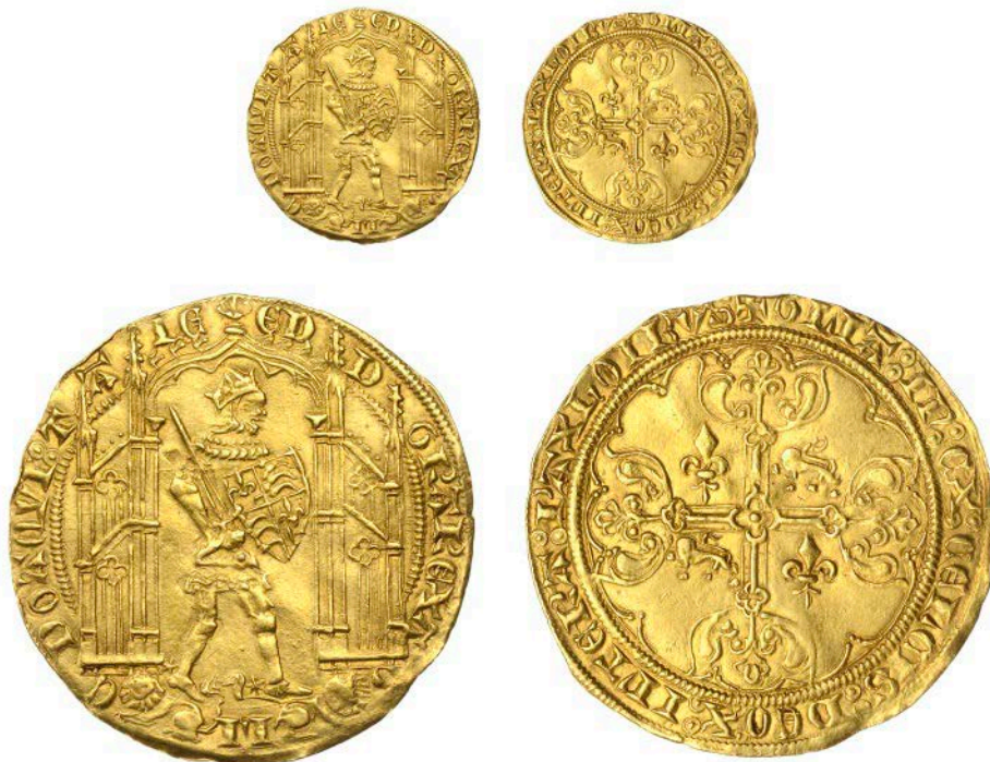
2372 Guyennois d'or, third type, no mint letter, mm. cross potent on rev. only, crowned full length figure of King standing right, wearing armour, holding sword and shield, lions at feet, rev. ornate cross, lis and leopards in angles, 3.87g/3h (Elias 50). Of fine style, nearly extremely fine, rare £10,000-15,000