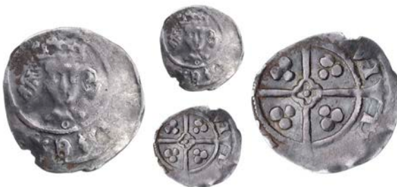
2158 Light coinage, Penny, York, mm. cross pattée on obv. only, annulet below bust, rev. quatrefoil in centre, 0.72g/4h (N 1364; S 1734). Struck off-centre on a small flan, fine, reverse better, rare £250-300