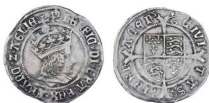
2183 First coinage, Groat, Tournai, mm. crowned cursive T, CIVITAS TORNACEN', 2.80g/4h (N –; S 2317). About very fine, toned, very rare £2,000-2,500