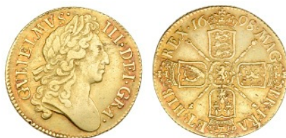
2547 Guinea, 1698, normal date figures and lettering (MCE 179; S 3460). Very fine or better £1,200-1,500