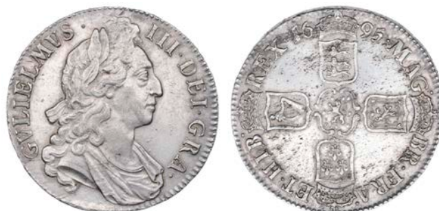
2549 Crown, 1695, first bust, edge SEPTIMO (ESC 86; S 3470). Extremely fine or better, the reverse rather proof-like £800-1,000