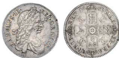
2517 Shilling, 1663, first bust (ESC 1022; S 3371). Some haymarking and a small rim flaw at 2 o'clock, otherwise very fine