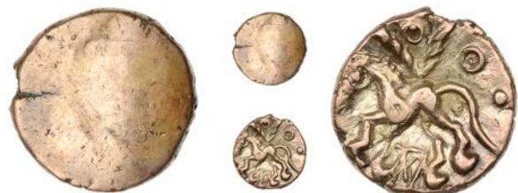
2400 Uninscribed issues, Quarter-Stater, Late Weald type, similar, 1.31g (ABC 198; BMC 2469-70; VA 151; S 172). Very fine £200-250