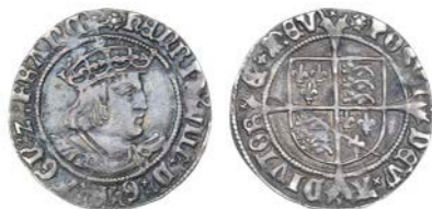
2186 Second coinage, Groat, Tower, mm. rose, bust D, reads FRANC', saltires in forks, 2.62g/7h (Whitton i, 3; N 1797; S 2337E). A few light surface scratches and a reverse die break, otherwise about very fine, toned £150-200