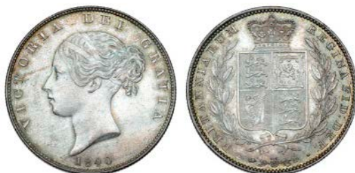
2709 Halfcrown, 1840 (ESC 673; S 3887). Good extremely fine, lightly toned