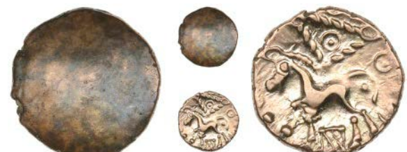
2398 Uninscribed issues, Quarter-Stater, Late Weald type, similar, 1.34g (ABC 198; BMC 2469-70; VA 151; S 172). Very fine or better £250-300