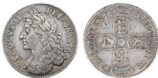
2529 Halfcrown, 1686, first bust, edge TERTIO, v of IACOBVS over s (ESC 496A; S 3408). About very fine, the variety rare