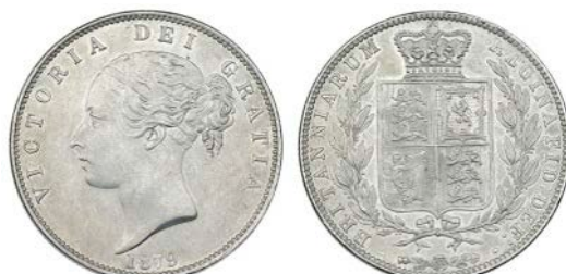
2712 Halfcrown, 1879 (ESC 703; S 3889). Virtually as struck