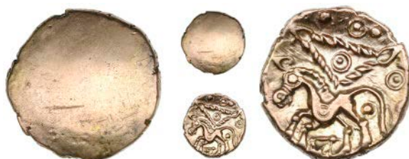
2392 Uninscribed issues, Quarter-Stater, Late Weald type, blank, rev. horse left, corded triangle above, lattice-work box below, pellets and annulets around, 1.43g (ABC 198; BMC 2469-70; VA 151; S 172). Nearly extremely fine £300-350