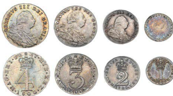
2623 Maundy set, 1800 (ESC 2421; S 3764) [4]. Penny scratched on obverse, very fine to extremely fine, toned