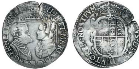
2474 Shilling, 1554, full titles and mark of value, reads HISP , 6.23g/12h (N 1967; S 2500). Creased and with a small edge crack, otherwise nearly very fine with good portraits £600-800