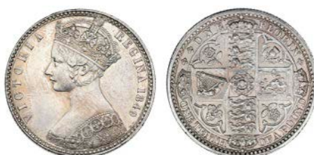
2714 Florin, 1849, with initials (ESC 802; S 3890). Good extremely fine