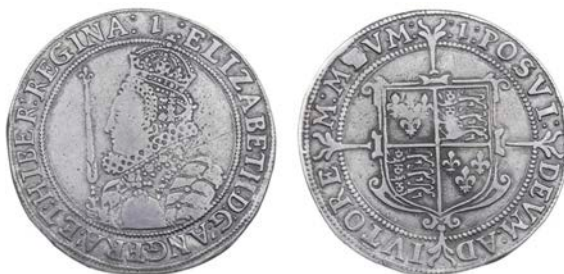
2200 Seventh issue, Halfcrown, mm. 1, 14.89g/10h (N 2013; S 2583). Face smoothed, otherwise fine or better £1,500-2,000