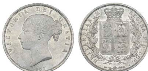
2713 Halfcrown, 1887, young head (ESC 717; S 3889). A few minor surface marks, otherwise virtually mint state