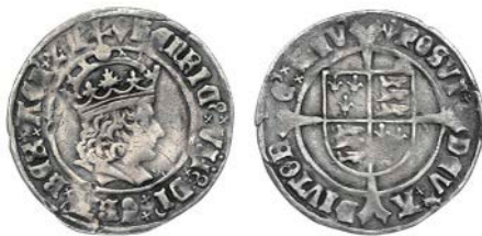
2175 Profile issue, Groat, regular type, mm. pheon, 2.83g/3h (N 1747; S 2258). Some surface marks and scratches, otherwise nearly very fine £150-200