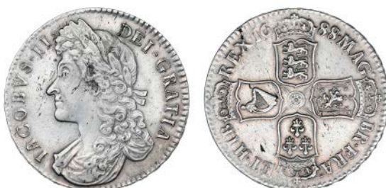
2531 Halfcrown, 1688, second bust, edge QVARTO (ESC 502; S 3409). A few obverse metal flaws, otherwise good very fine, rare