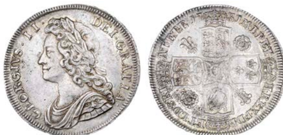
2592 Halfcrown, 1731, roses and plumes, edge QUINTO (ESC 595; S 3692). Good very fine £600-700