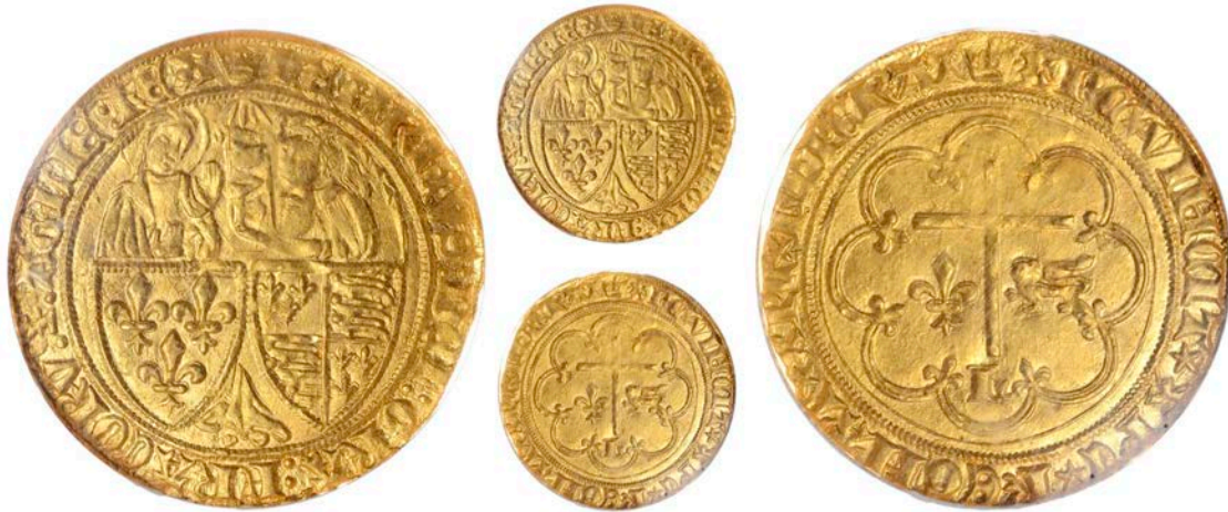
2379 Salut d'or, Paris, mm. crown, AVE inscribed upwards, 11h (Elias 264). Extremely fine or better £1,200-1,500 Slabbed in NGC holder, graded MS 63