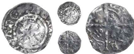
2159 Light coinage, Halfpenny, London, mm. cross pattée on obv. only, annulets by neck, 0.36g/7h (Withers 2; N 1367; S 1737). About fine £150-200