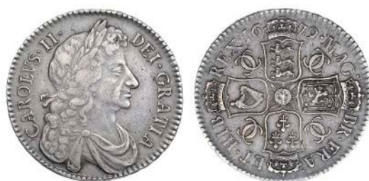
2516 Halfcrown, 1679, fourth bust, edge TRICESIMO PRIMO, reads DECNS (ESC 483; S 3367). Good very fine, the error edge reading rare