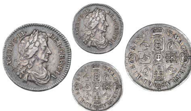
2524 Sixpence, 1683 (ESC 1523; S 3382). Minimal haymarking, better than very fine, toned £250-300