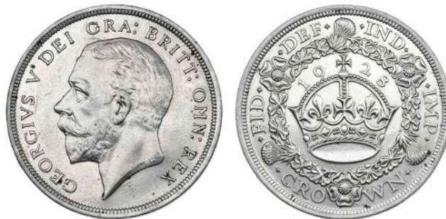
2752 Crown, 1928 (ESC 368; S 4036). Some surface marks, otherwise good very fine