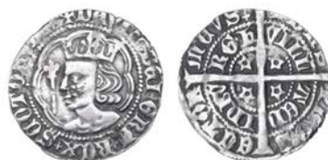
2214 David II (1329-71), Halfgroat, class C, Edinburgh, mm. cross pattée, older bust with aquiline nose, tressure of six arcs, nothing in spandrels, crosslet stops, 2.16g/6h ( cf. SCBI 35, 398ff; cf. B 15, fig. 293; S 5109). About very fine £200-250