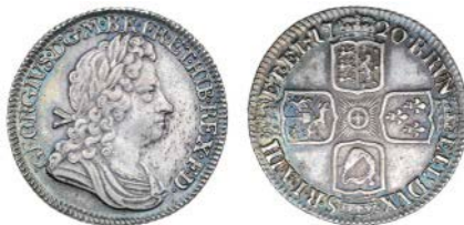
2581 Shilling, 1720, plain (ESC 1168; S 3646). A little haymarked in front of face, otherwise good very fine with attractive toning