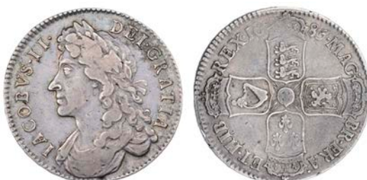
2528 Halfcrown, 1685, edge PRIMO (ESC 493; S 3408). Small weak spot at date, otherwise good fine