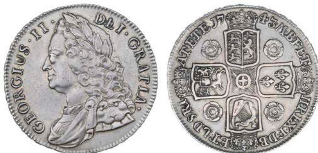
2590 Crown, 1743, roses, edge DECIMO SEPTIMO (ESC 124; S 3688). Better than very fine £800-1,000