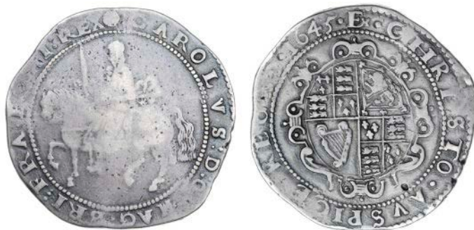
2211 Exeter mint, Crown, 1645, mm. rose on obv. , Ex on rev. , 27.27g/4h (Besly C16; SCBI Brooker 1037, same dies; N 2558; S 3076). Obverse fine, reverse nearly very fine £500-700