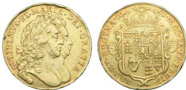
2532 Five Guineas, 1691, edge TERTIO (MCE 136; S 3422). Edge knocks and bruises, some surface marks, otherwise about very fine £3,000-3,500