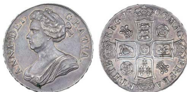
2561 Crown, 1706, roses and plumes, edge QUINTO (ESC 101; S 3578). About extremely fine, toned