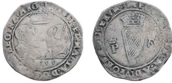
2216 Philip and Mary , Shilling, 1555, mm. portcullis on rev. only, reads ANG, 8.67g/2h (S 6500; DF 232). Nearly very fine for issue with reasonable portraits £500-600