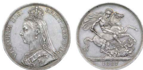
2706 Proof Crown, 1887 (ESC 297; S 3921). Marks in fields and hairlined, otherwise better than extremely fine £300-350