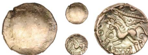
2396 Uninscribed issues, Quarter-Stater, Late Weald type, similar, 1.39g (ABC 198; BMC 2469-70; VA 151; S 172). Good very fine £250-300