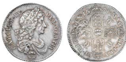
2518 Shilling, 1674, second bust, plume below and in centre of rev. (ESC 1040; S 3376). Good very fine, blue-grey tone, rare