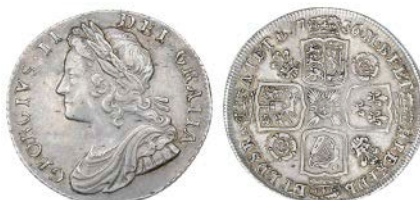
2596 Shilling, 1736/5, roses and plumes (ESC 1199A; S 3700). Very fine