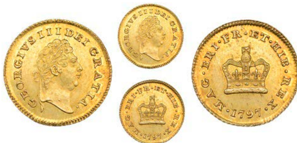
2612 Third-Guinea, 1797, first bust (MCE 449; S 3738). Good extremely fine, deep attractive red tone £450-550