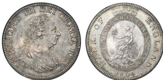
2631 Dollar, 1804, types A/2 (ESC 144; S 3768). Good very fine, toned