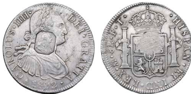
2630 MEXICO, Charles III, 8 Réales, 1802 FT , Mexico City, obv. countermarked with head of George III in octagon (ESC 138; S 3766). Die break in obverse field, otherwise coin and counterstamp good very fine, scarce £1,000-1,200