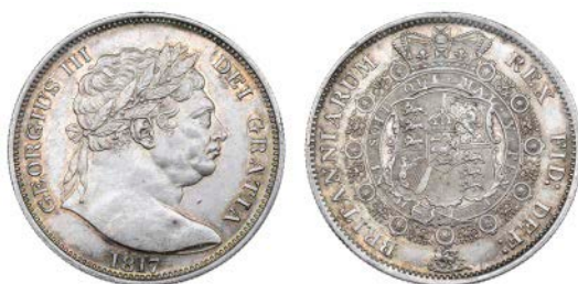
2646 Halfcrown, 1817, large head (ESC 616; S 3788). Extremely fine or better