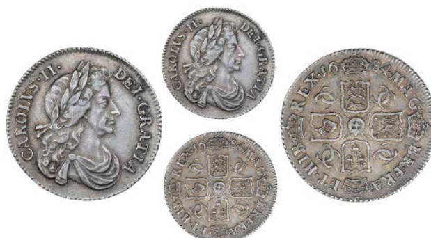
2525 Sixpence, 1684 (ESC 1524; S 3382). Good very fine or better, toned £300-350