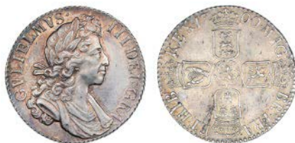
2556 Shilling, 1700, fifth bust (ESC 1121; S 3516). Nearly extremely fine, lightly toned