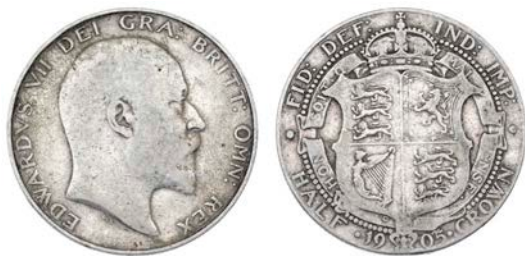
2742 Halfcrown, 1905 (ESC 750; S 3980). About fine, very rare