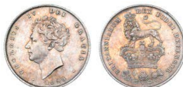
2784 1829 (Davies 235; ESC 1260; S 3812). Minor hairlines, otherwise extremely fine, toned