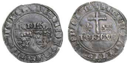
2381 Grand Blanc aux Écus, Paris, mm. crown, 3.05g/8h (Elias 279). Light score on reverse, otherwise very fine, dark tone £150-200