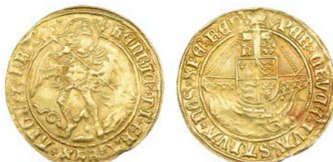
2169 Angel, class V, mm. pheon, rev. reads RED', 5.12g/2h (SCBI Schneider 543; N 1698; S 2187). Slight crease mark, otherwise better than very fine £1,200-1,500