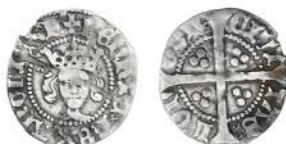
2162 Penny, class D, London, mullet and annulet by crown, 0.87g/11h (N 1397; S 1779). Good fine £60-80