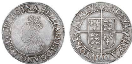
2197 Second issue, Shilling, mm. cross-crosslet, bust 3C, 5.97g/4h (N 1985; S 2555). Light scratches on face, otherwise good fine, reverse very fine £200-250