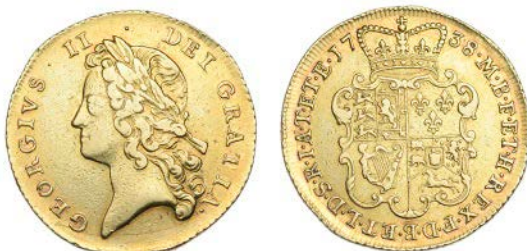
2585 Two Guineas, 1738 (MCE 291; S 3667B). Nearly very fine £600-800