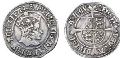
2179 First coinage, Groat, Tower, mm. castle, 3.05g/7h (N 1762; S 2316). About very fine £150-200