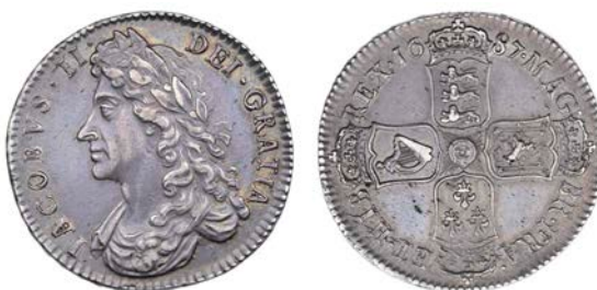
2530 Halfcrown, 1687, first bust, edge TERTIO (ESC 498; S 3408). Nearly extremely fine, toned, rare

Provenance: Spink Auction 208, 22-3 June 2011, lot 921 (described as v/B)