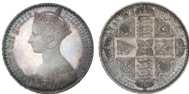
2705 Crown, 1847, edge UNDECIMO (ESC 288; S 3883). A few light hairlines, otherwise practically as struck, toned £1,500-2,000