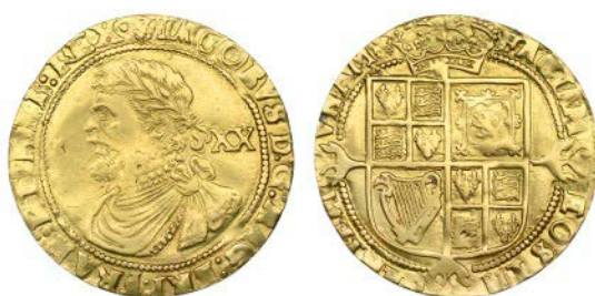
2205 Third coinage, Laurel, mm. thistle, third bust, 8.72g/1h (SCBI Schneider –; N 2113; S 2638A). About very fine £800-1,000