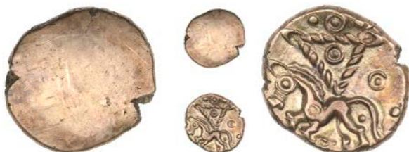
2393 Uninscribed issues, Quarter-Stater, Late Weald type, similar, 1.38g (ABC 198; BMC 2469-70; VA 151; S 172). Nearly extremely fine £300-350