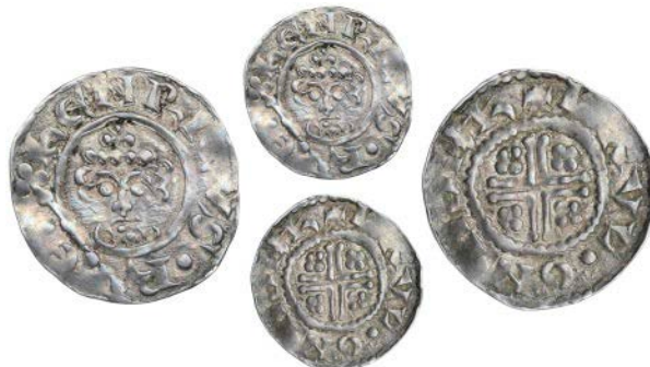
2242 Penny, class Ib, Northampton, Raul, RAVL · ON · NORH , 1.45g/8h (SCBI Mass 421; N 963; S 1344). Legends weak in places, otherwise very fine, rare £90-120

SCBI states H.R. Mossop Collection, pl.xciii, 16, this coin , but comparison with the Mossop plate contradicts this