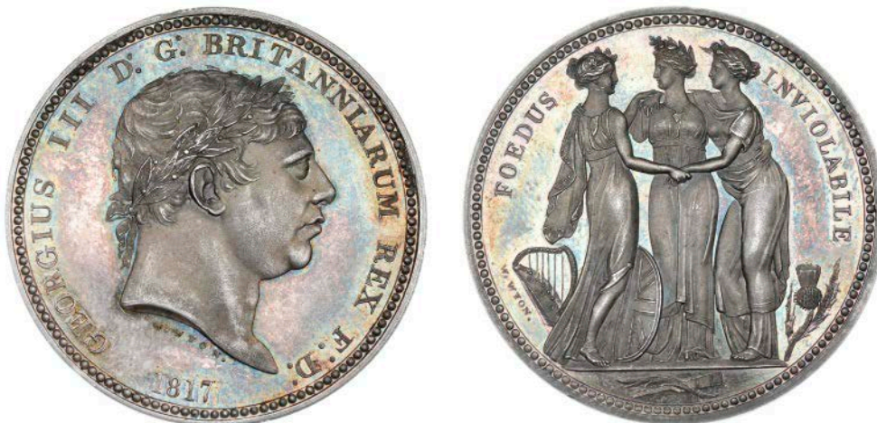
2643 Pattern Crown, 1817, by W. Wyon, in silver, laureate bust right, rev. the Three Graces standing, nationalistic emblems at their feet, edge plain, 26.53g/12h (Davies 20; L & S 152; ESC 223; Selig 1187-8). Some friction on high spots, otherwise better than extremely fine, attractively toned £6,000-8,000