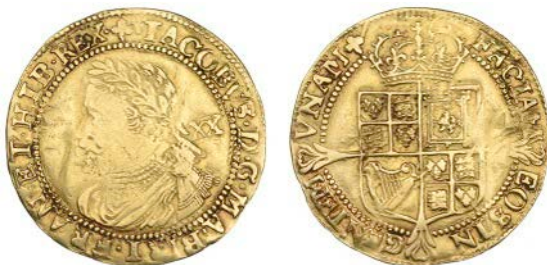
2206 Third coinage, Laurel, mm. trefoil, fourth bust, 8.76g/11h (SCBI Schneider –; N 2114; S 2638B). Creased, obverse nearly fine, reverse good fine or better £500-600