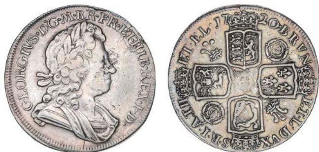
2576 Crown, 1720/18, roses and plumes, edge SEXTO (?) (ESC 113; S 3639). A little haymarking on face, otherwise good fine, reverse better, the edge error extremely rare £800-1,000

The edge on this coin appears to have been applied twice, the first reading DECVS ET TVTAMEN ANNO...SE; the second, inverted, reads TVTA...ITO. The rest of the coin however shows no sign of over-striking or double-striking