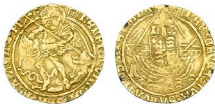
2178 First coinage, Angel, mm. crowned portcullis with chains, saltire stops, 4.21g/8h (SCBI Schneider 561; N 1760; S 2265). Small of flan and removed from a mount, otherwise good fine £600-800