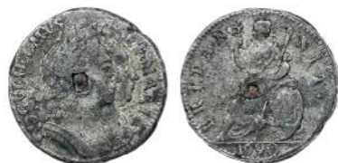
2545 Farthing, 1690 (BMC 577A; S 3451). Good fine, free of tin pest; copper plug £250-350