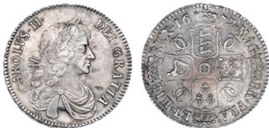
2515 Halfcrown, 1672, third bust variety, edge VICESIMO QUARTO (ESC 471; S 3366). Good extremely fine, toned, rare