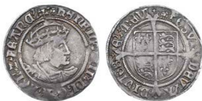
2185 Second coinage, Groat, Tower, mm. rose, bust B, reads FRANC', saltires in forks, 2.62g/3h (Whitton i, 3; N 1797; S 2337D). Nearly very fine £120-150