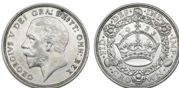
2755 Crown, 1933 (ESC 373; S 4036). A few minor surface marks, otherwise good very fine