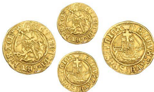
2171 Half-Angel, type V, mm. pheon, 2.55g/1h (SCBI Schneider 546-7; N 1702; S 2192). Nearly very fine on a full round flan £1,000-1,200