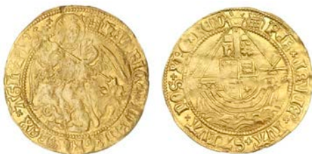
2177 First coinage, Angel, mm. crowned portcullis with chains, saltire stops, 5.13g/3h (SCBI Schneider 561; N 1760; S 2265). A little creased and crimped, small spade mark at 2 o'clock, otherwise good very fine £1,000-1,200