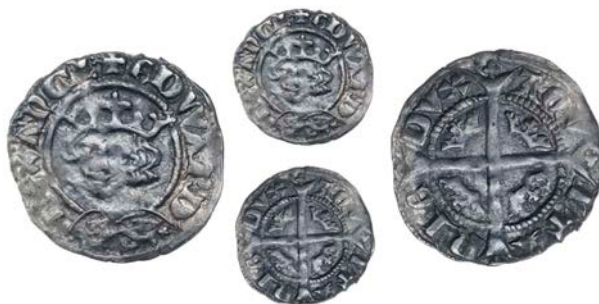
2373 Esterlin, bust three-quarters left, leopard below, rev. cross, crowns in angles, 1.31g/4h (Elias 56a). Very fine £300-400