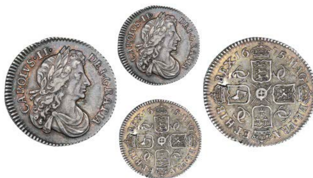
2521 Sixpence, 1675/4 (ESC 1514; S 3382). Small edge flaw, otherwise better than very fine and toned, the overdate rare £350-400