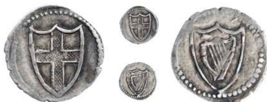
2213 Halfpenny (N 2730; S 3223). Good very fine on a round flan