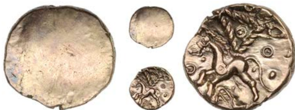
2397 Uninscribed issues, Quarter-Stater, Late Weald type, similar, 1.37g (ABC 198; BMC 2469-70; VA 151; S 172). Better than very fine £250-300