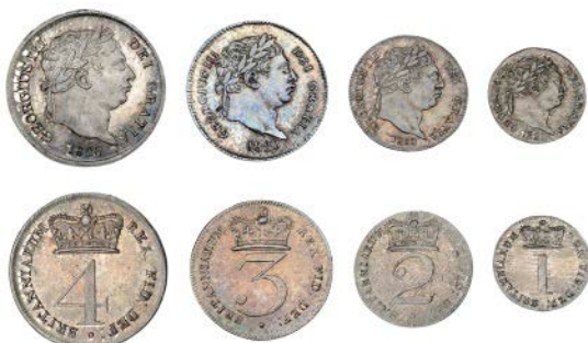
2651 Maundy set, 1820 (ESC 2424; S 3792) [4]. Extremely fine or better, toned