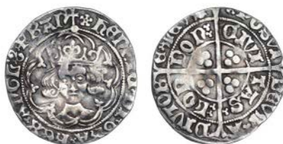
2172 Facing Bust issue, Groat, class II, mm. cinquefoil, trefoil stops, trefoil after DEVM and ADIVTORE, 2.49g/5h (cf. SCBI Ashmolean 218ff; N 1704; S 2195). Sometime polished and a little small of flan, otherwise nearly very fine £100-150