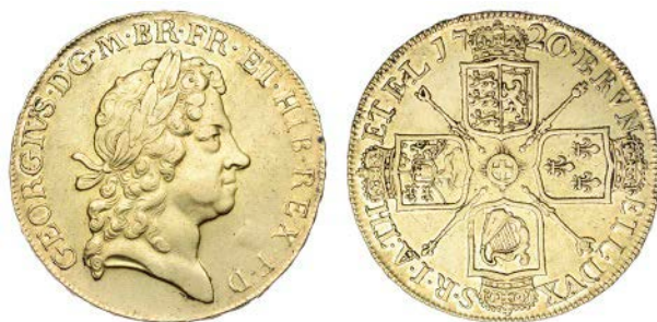
2571 Five Guineas, 1720, edge SEXTO (MCE 240; S 3626). A few surface marks, otherwise very fine or better £5,000-7,000