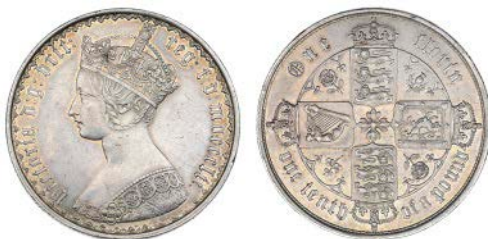
2716 Florin, 1852 (ESC 806; S 3891). Obverse surface marks, otherwise extremely fine