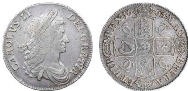
2504 Crown, 1663, first bust, edge xv (ESC 22; S 3354). Light adjustment marks on reverse, otherwise very fine £400-450