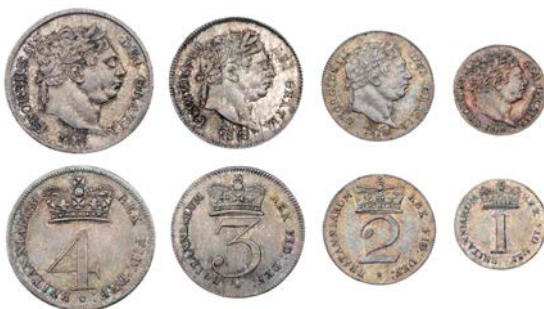
2650 Maundy set, 1818 (ESC 2423; S 3792) [4]. Extremely fine or better, toned