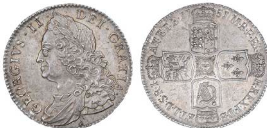
2595 Halfcrown, 1751, edge VICESIMO QVARTO (ESC 610; S 3696). Better than extremely fine, toned