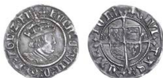
2187 Second coinage, Halfgroat, Canterbury, Abp Warham, mm. cross patonce, wa by shield, 1.21g/8h (Whitton iii; N 1802; S 2343). Good very fine, dark tone £100-150