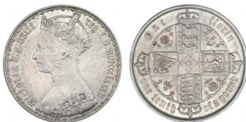
2721 Florin, 1885 (ESC 861; S 3900). Better than extremely fine