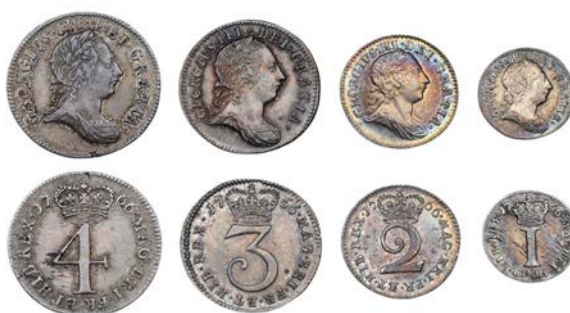
2621 Maundy set, 1766 (ESC 2414; S 3762) [4]. Very fine to extremely fine, scarce