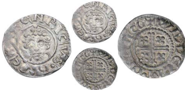
2241 Penny, class Ib, Lincoln, Willelm, WILLELM · ON · NICO , 1.21g/6h (SCBI Mass 401; Mossop dies Gc and pl.xciii, 16; N 963; S 1344). Legends weak at one point, otherwise very fine £100-150

Provenance: H.R. Mossop Collection; J.P. Mass Collection, Part III, DNW Auction 69, 15 March 2006, lot 886 [from Baldwin 1988]