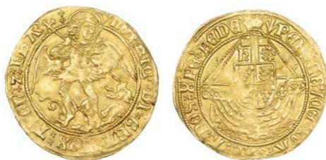
2168 Angel, class V, mm. pheon, rev. reads REDE', 5.14g/4h (SCBI Schneider 542; N 1698; S 2187). Good very fine £1,200-1,500