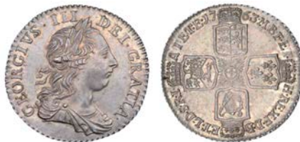
2619 Shilling, 1763 (ESC 1214; S 3742). Extremely fine or better, attractively toned