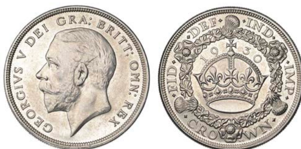
2753 Crown, 1930 (ESC 370; S 4036). Small mark on hair, otherwise good extremely fine, scarce