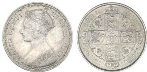
2719 Florin, 1881 (ESC 856; S 3900). Extremely fine