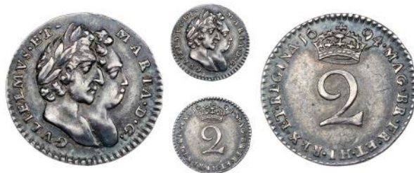
2544 Twopence, 1694, pointed 4, reads MARLA (ESC 2205; S 3443). Nearly extremely fine, toned, rarer than indicated in ESC £200-250