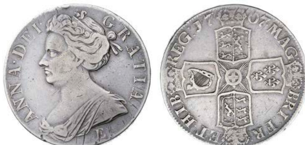
2563 Crown, 1707 E , second bust, edge SEPTIMO (ESC –; cf. S 3600). Some edge nicks and surface marks, otherwise good fine or better, excessively rare £2,000-2,500

ESC does not give this edge reading for the date, though it does list the 1708/7 overdate. The only main reference to list it is Coincraft's Standard Catalogue of English and UK Coins (ANCR-030)