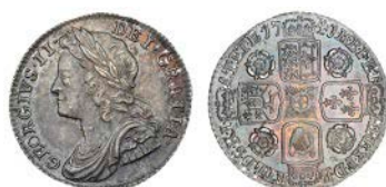
2600 Sixpence, 1741, roses (ESC 1613; S 3708). Better than extremely fine, attractively toned