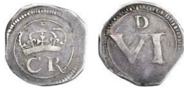
2218 Charles I (1625-49), Ormonde Money, Sixpence, 2.84g/4h (S 6547; DF 302). Nearly very fine £250-300