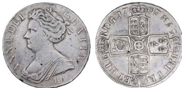
2562 Crown, 1707 E , second bust, edge SEXTO (ESC 103; S 3600). Minor rim flaw at 7 o'clock, otherwise better than fine £250-300