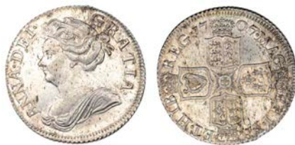
2567 Shilling, 1707, third bust (ESC 1141; S 3610). Some light haymarking, otherwise practically as struck £400-500