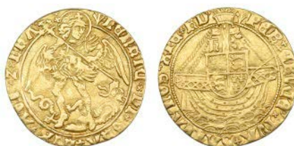
2170 Angel, class V, mm. pheon, rev. reads RD', 4.30g/1h (SCBI Schneider –; N 1698; S 2187). Small of flan, otherwise nearly very fine £700-900