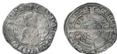
2377 Demi-Gros, second issue, Limoges, 2.17g/3h (Elias 178d). Rather weakly struck, otherwise nearly very fine £150-200

Provenance: Münzen und Medaillen Auktion 95 (Basle), 4-5 October 2004, lot 439