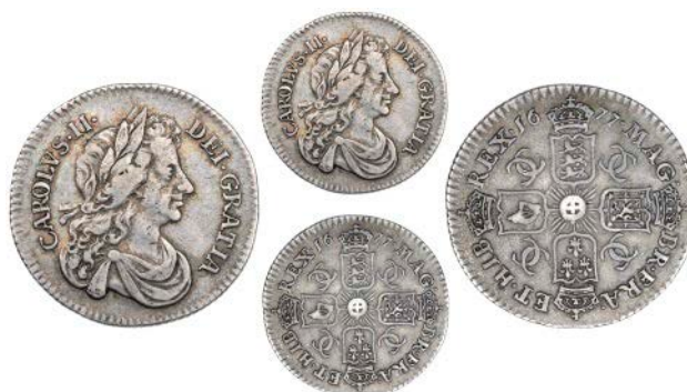
2523 Sixpence, 1677 (ESC 1516; S 3382). Good fine £120-150 Provenance: W.C. Boyd Collection, Baldwin Auction 42, 26 September 2005, lot 1065 (part)