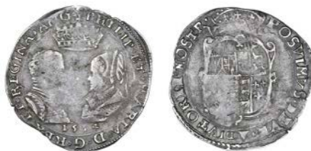
2475 Sixpence, 1554, English titles, date below busts , reads NOSTR , annulet stops, 2.92g/5h (N 1972; S 2507). Centres weak, otherwise fine, very rare £2,500-3,000