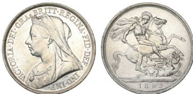
2708 Crown, 1893, dies 1+B, edge LVI (Davies 503; ESC 303; S 3937). About extremely fine, the variety rare £90-120