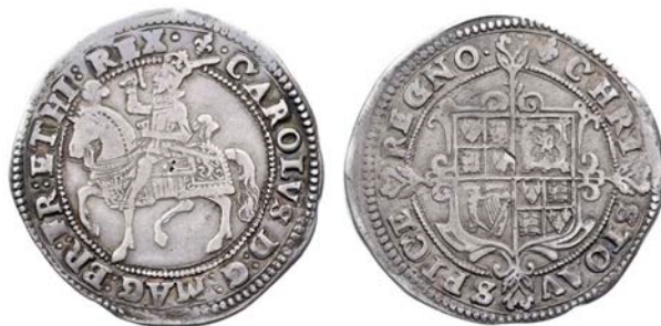
2209 Tower mint, Halfcrown, Gp I, mm. lis, housings decorated, no rose or groundline, 14.39g/4h (SCBI Brooker 279ff; N 2201; S 2764). Two small digs on side of horse, otherwise nearly very fine £500-600