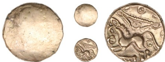
2394 Uninscribed issues, Quarter-Stater, Late Weald type, similar, 1.35g (ABC 198; BMC 2469-70; VA 151; S 172). Nearly extremely fine £300-350