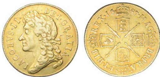
2526 Two Guineas, 1687 (MCE 121; S 3399). Nearly very fine, reddish tone