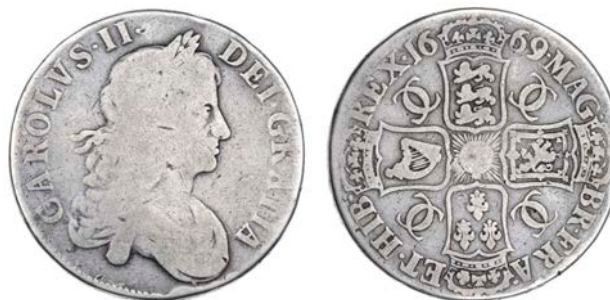
2510 Crown, 1669/8, second bust, edge VICESIMO PRIMO (ESC 39; S 3357). About fine, reverse better, very rare