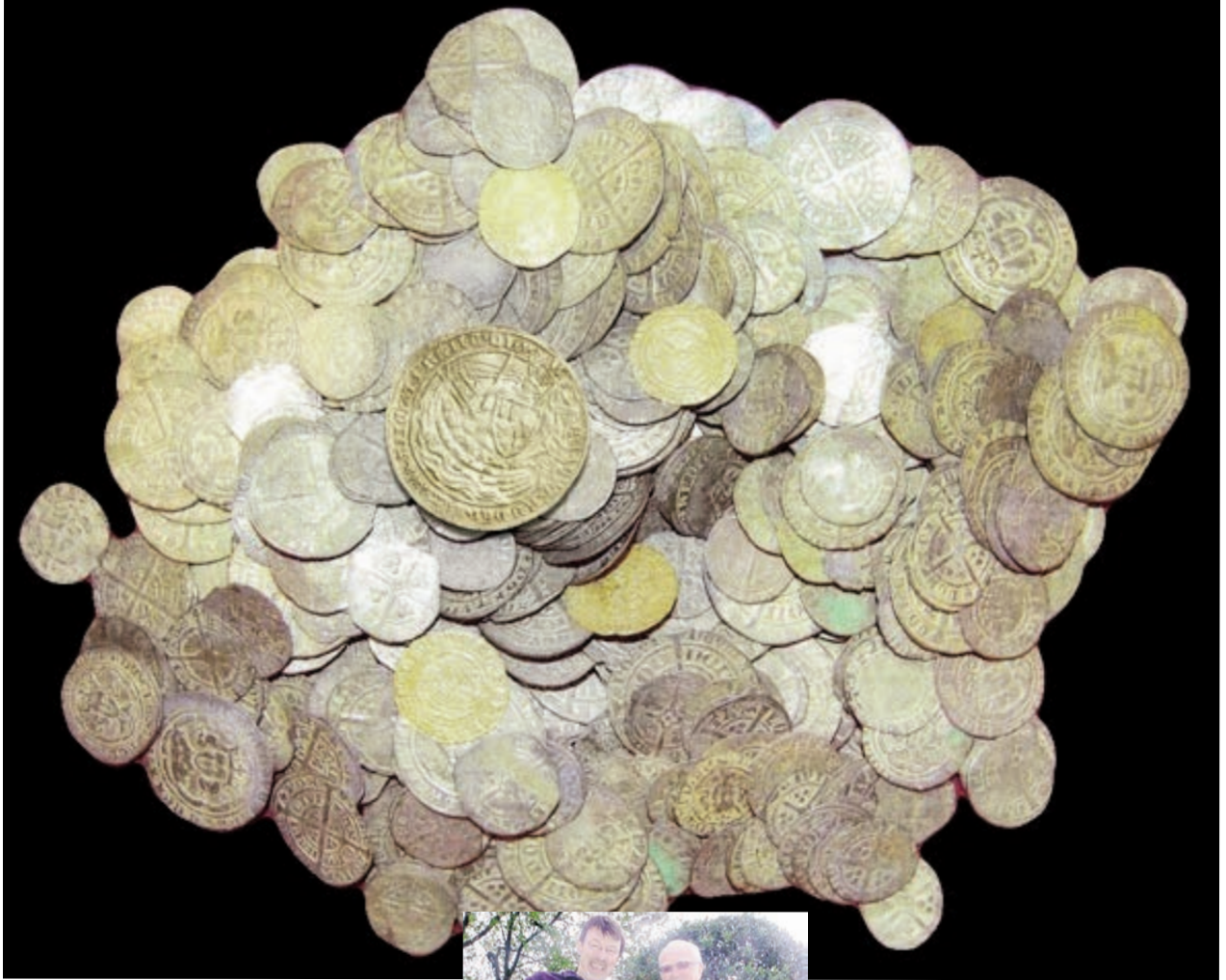
The Corringham Hoard