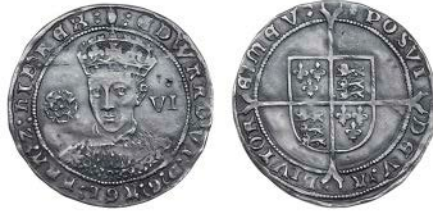
2472 Third period, Fine issue, Sixpence, London, mm. tun, 2.99g/5h (N 1938; S 2483). Slight crease marks and small dig in obverse field, otherwise better than very fine £400-500