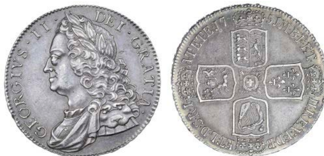
2591 Crown, 1751, edge VICESIMO QUARTO (ESC 128; S 3690). Small obverse edge flaw, otherwise about extremely fine £1,600-1,800