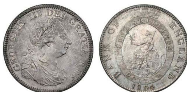
2633 Dollar, 1804, types E/2, no stop after REX (ESC 164; S 3768). Good extremely fine, lightly toned