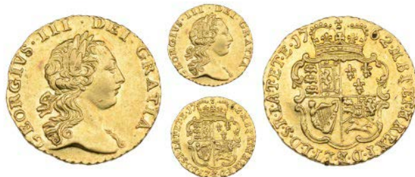
2616 Quarter-Guinea, 1762 (MCE 463; S 3741). Some surface marks, otherwise nearly extremely fine £400-450