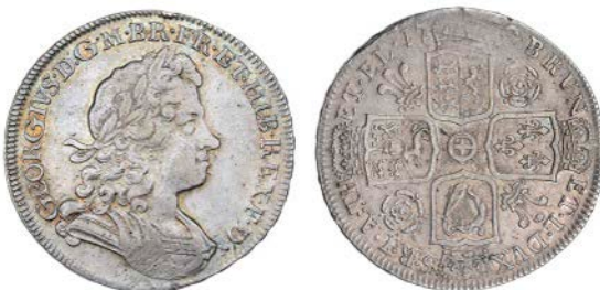
2580 Halfcrown, 1720/17, roses and plumes, edge SEXTO (ESC 590; S 3642). A few edge and surface marks, blank filing by date, otherwise good fine or better