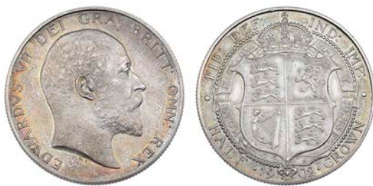
2739 Proof Halfcrown, 1902 (ESC 747; S 3980). Matt, almost as struck, lightly toned