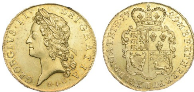
2584 Five Guineas, 1729 EIC, edge TERTIO (MCE 279; S 3664). Rim cut at 1 o'clock on obverse and edge bruise at 6 o'clock on reverse, otherwise about extremely fine or better £8,000-10,000