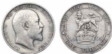
2744 Shilling, 1905 (ESC 1414; S 3982). Better than fine