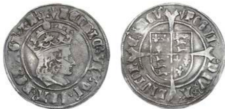
2174 Profile issue, Groat, regular type, mm. pheon, 3.00g/5h (N 1747; S 2258). Small cut on King's cheek, otherwise about very fine £200-250