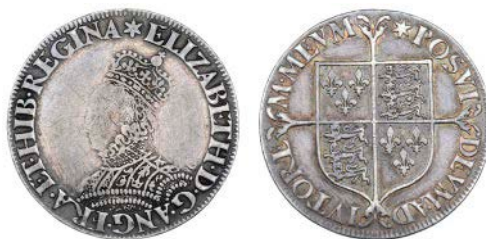
2201 Milled coinage, Shilling, intermediate size, mm. star, 30mm, 5.93g/6h (Borden/Brown 16, O3/R3; N 2023; S 2591). Lightly tooled in fields and the Queen's face flat, otherwise good fine £200-250