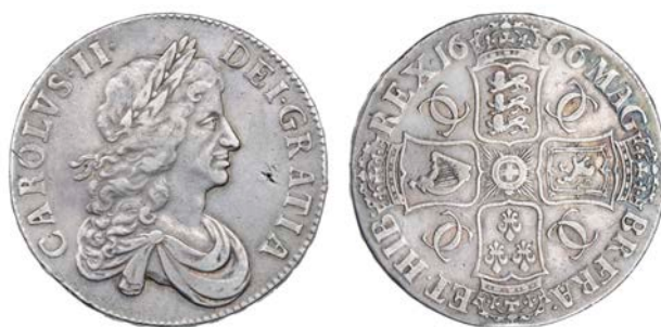
2506 Crown, 1666, second bust, edge xviii (ESC 32; S 3355). Small flan flaw in obverse field, otherwise good very fine, toned, rare £1,200-1,500