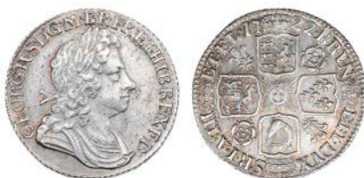
2582 Shilling, 1722, roses and plumes (ESC 1174; S 3645). Minimal haymarking, otherwise good very fine, reverse better