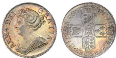
2569 Shilling, 1708, third bust (ESC 1147; S 3610). Virtually as struck, attractively toned £500-700