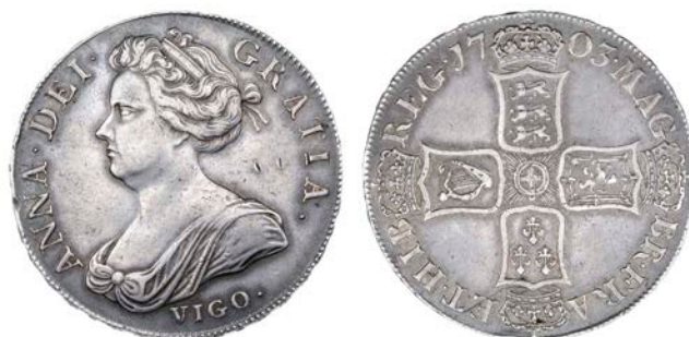
2560 Crown, 1703 VIGO, edge TERTIO (ESC 99; S 3576). Two small digs behind head, otherwise good very fine or better