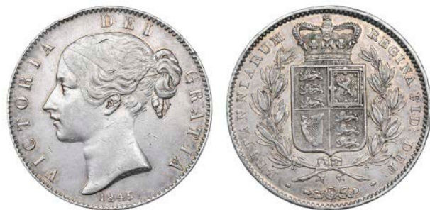
2704 Crown, 1845, edge VIII, cinquefoil stops (ESC 282; S 3882). A few edge knocks and surface marks, otherwise good very fine £350-450