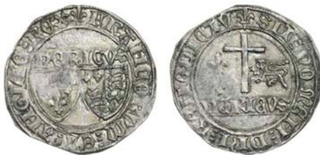
2382 Grand Blanc aux Écus, St Lô, mm. lis, 3.25g/6h (cf. Elias 288). Very fine £150-200