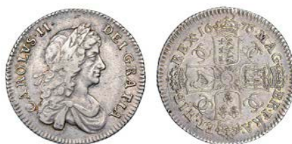
2519 Shilling, 1676, second bust (ESC 1047; S 3375). Better than very fine