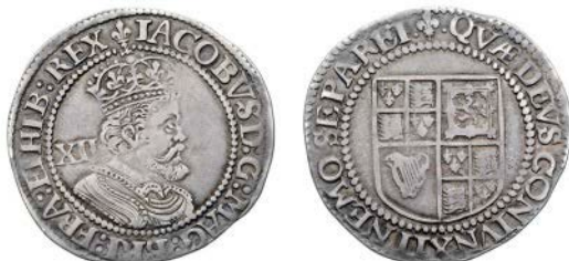
2207 Third coinage, Shilling, mm. lis, sixth bust, 5.93g/7h (N 2124; S 2668). Very fine and toned, with a good portrait £300-350