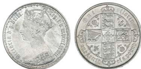
2720 Florin, 1883 (ESC 859; S 3900). Extremely fine, reverse better