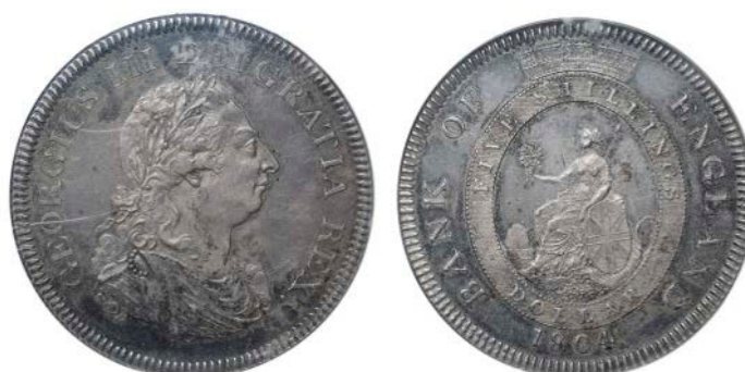
2632 Dollar, 1804, types C/2a (ESC 153; S 3768). Good extremely fine, toned