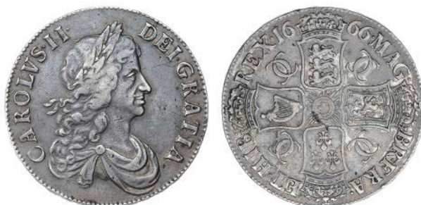
2508 Crown, 1666, second bust, edge xviii (ESC 32; S 3355). Very fine or better £800-1,000