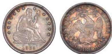
1464 Quarter-Dollar, 1889. Virtually mint state, toned