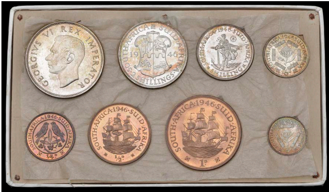
1409 George VI, Proof set, 1946, comprising Halfcrown to Farthing (Hern P19; KM. PS18) [8]. About as struck, silver a little tarnished; in card case of issue £600-800 150 sets issued