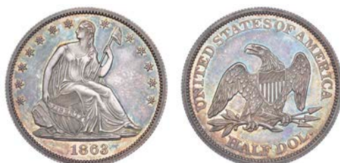
1462 Proof Half-Dollar, 1863, edge grained, 12.44g/6h. Possibly lightly lacquered at some time, a few light marks and hairlines, otherwise virtually as struck with much brilliance, toned