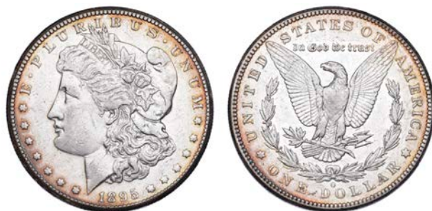
1460 Dollar, 1895o. Small cuts on face and neck, otherwise very fine or better but has been cleaned