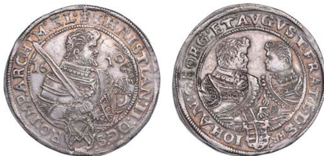
1340 SAXONY, Christian II, Johann Georg and August , Thaler, 1610HR, Chemnitz, 29.16g/7h (Dav. 7566; KM. 24). Perhaps removed from a ring mount, otherwise better than very fine, lightly toned £120-150