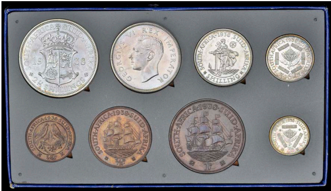
1402 George VI, Proof set, 1938, comprising Halfcrown to Farthing (Hern P14; KM. PS12) [8]. About as struck, toned; in card case of issue [this damaged] £1,000-1,200 44 sets issued