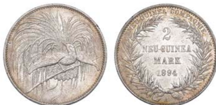
1337 William II , 2 Marks, 1894A (KM. 6). Extremely fine or better £200-250