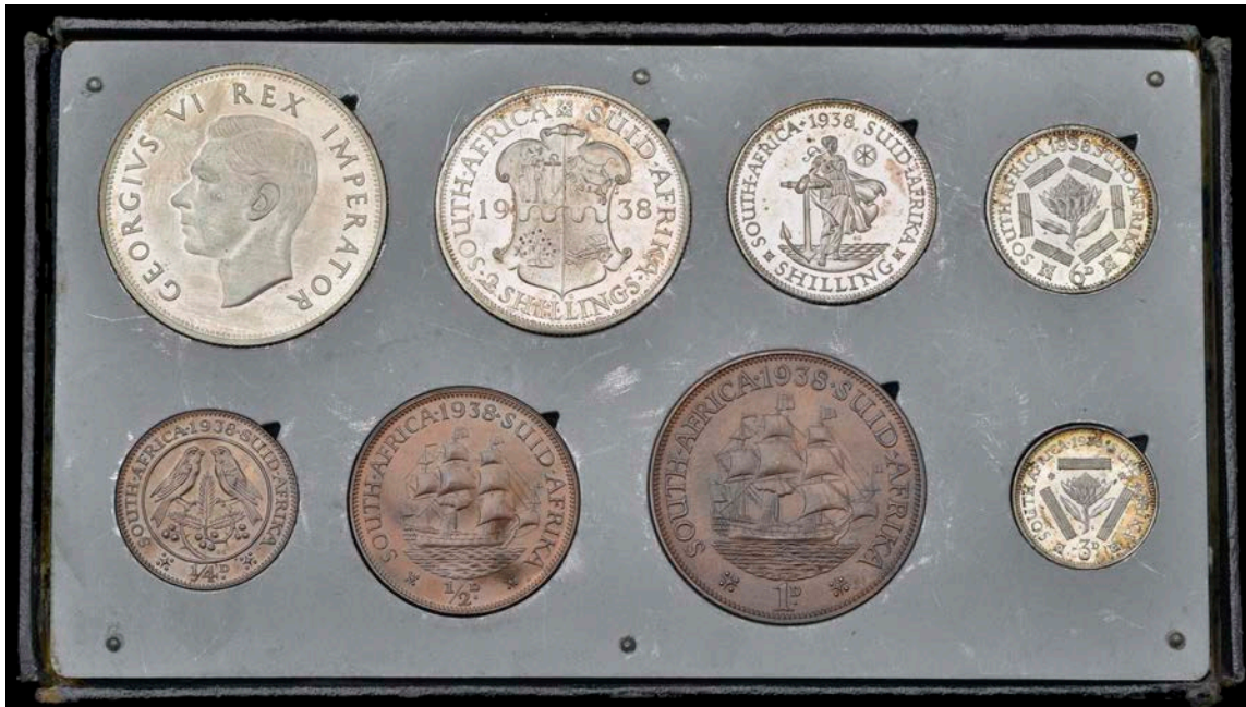
1401 George VI, Proof set, 1938, comprising Halfcrown to Farthing (Hern P14; KM. PS12) [8]. About as struck, toned; in card case of issue [this damaged] £1,000-1,200 44 sets issued