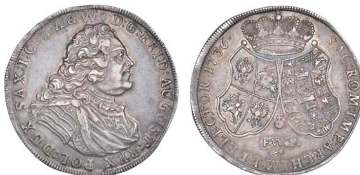
1341 SAXONY, Friedrich August II , Speciethaler, 1736FWOF, Dresden (KM. 880; Dav. 2665). Nearly extremely fine, toned £500-700