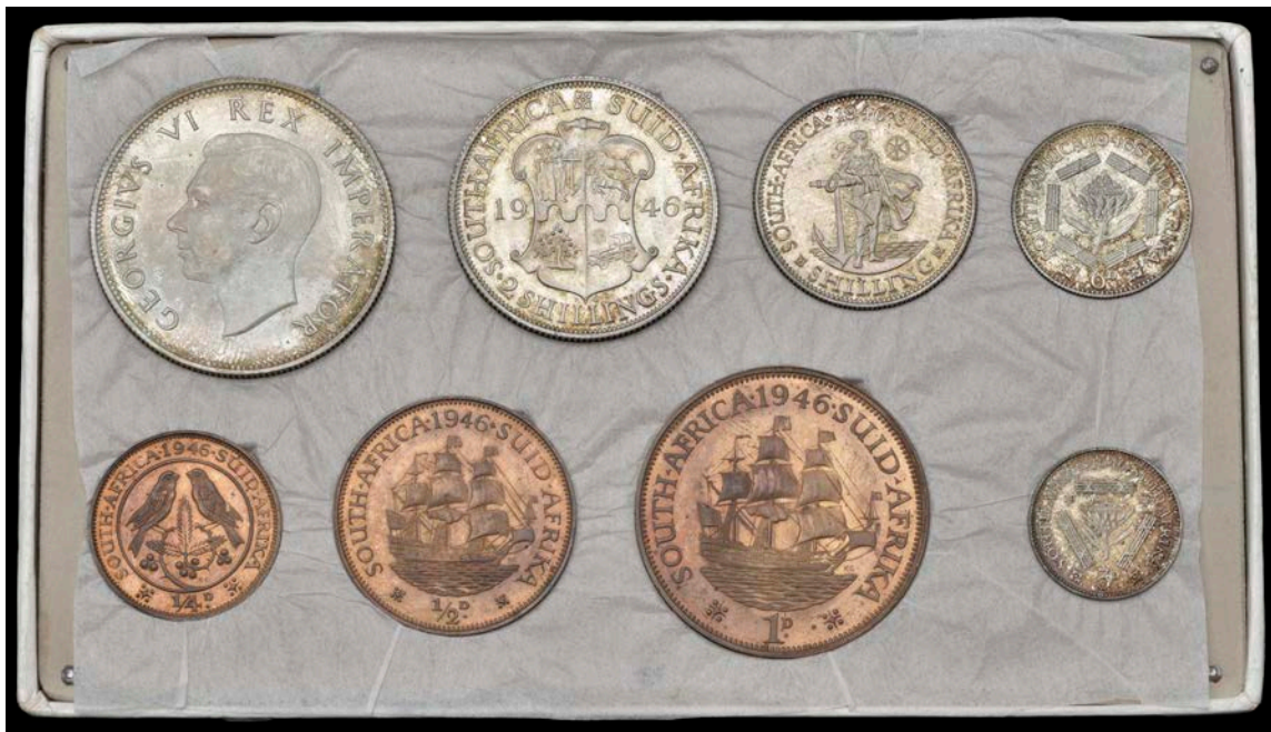
1410 George VI, Proof set, 1946, comprising Halfcrown to Farthing (Hern P19; KM. PS18) [8]. About as struck, silver a little tarnished; in card case of issue £600-800 150 sets issued