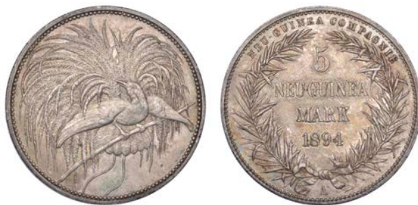
1336 William II , 5 Marks, 1894A (KM. 7). Light verdigris on reverse and some surface marks, otherwise about extremely fine £400-600