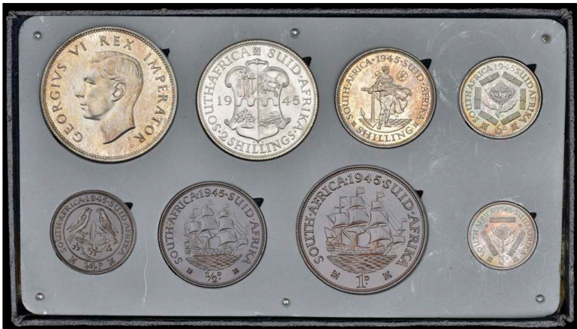
1406 George VI, Proof set, 1945, comprising Halfcrown to Farthing (Hern P18; KM. PS17) [8]. Silver has been lightly cleaned at some time, with hairlines, otherwise about as struck, toned; in card case of issue [this damaged] £600-800