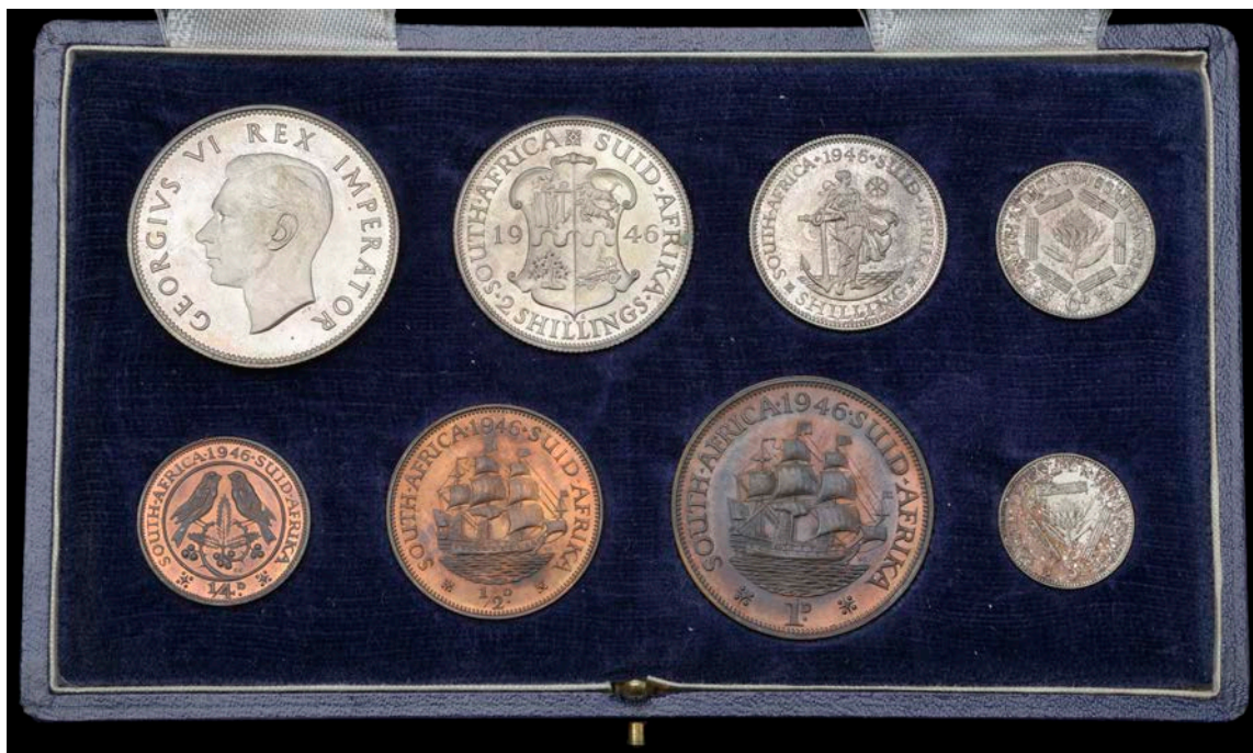
1408 George VI, Proof set, 1946, comprising Halfcrown to Farthing (Hern P19; KM. PS18) [8]. About as struck, silver a little tarnished; in SAM leather case £600-800