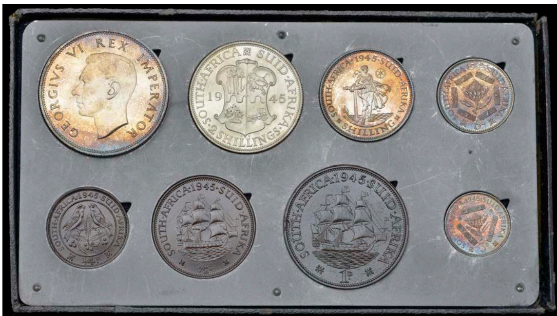
1404 George VI, Proof set, 1945, comprising Halfcrown to Farthing (Hern P18; KM. PS17) [8]. Florin a little dull, otherwise about as struck, dark tone; in card case of issue [this damaged] £600-800