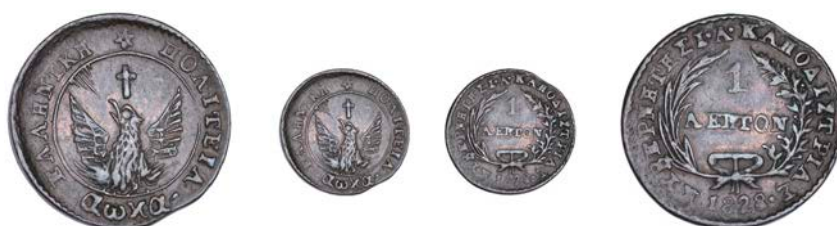
1342 John Capodistrias , Lepton, 1828, normal legend, 7 rays (cf. Spink 5, 51; KM. 1). Good very fine with traces of original colour £150-200