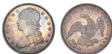
1463 Quarter-Dollar, 1837. A few rim nicks, otherwise better than extremely fine with rainbow toning, the reverse proof-like