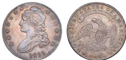
1461 Half-Dollar, 1835. Tiny cut above head and light scratch on cheek, otherwise good extremely fine, attractively toned