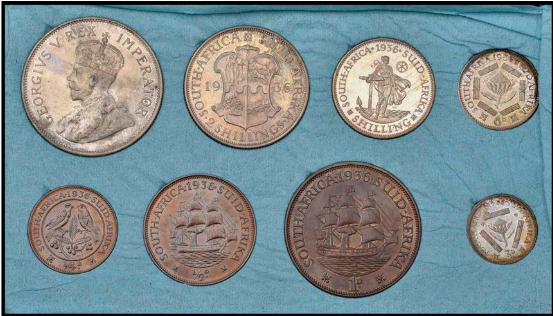
1399 George V, Proof set, 1936, comprising Halfcrown to Farthing (Hern P12; KM. PS11) [8]. Virtually as struck, toned; in case of issue, rare £2,500-3,000 40 sets issued