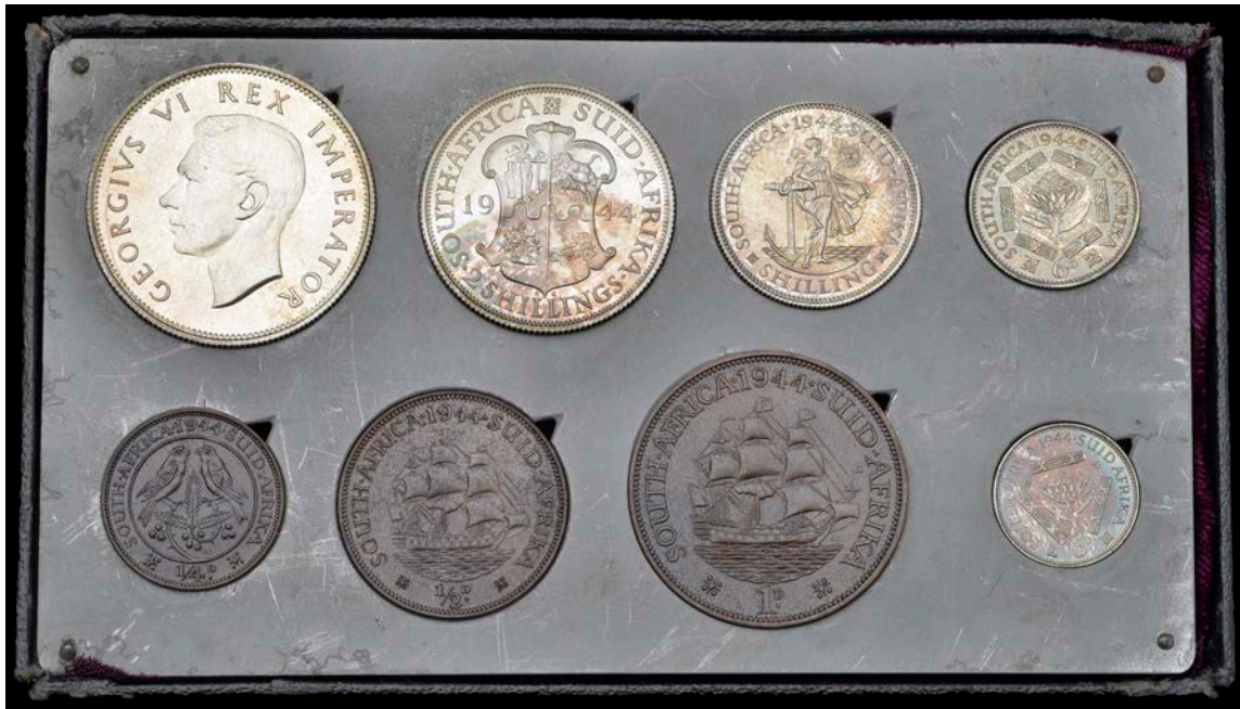
1403 George VI, Proof set, 1944, comprising Halfcrown to Farthing (Hern P17; KM. PS16) [8]. Silver lightly cleaned, otherwise about as struck, toned; in card case of issue £600-800