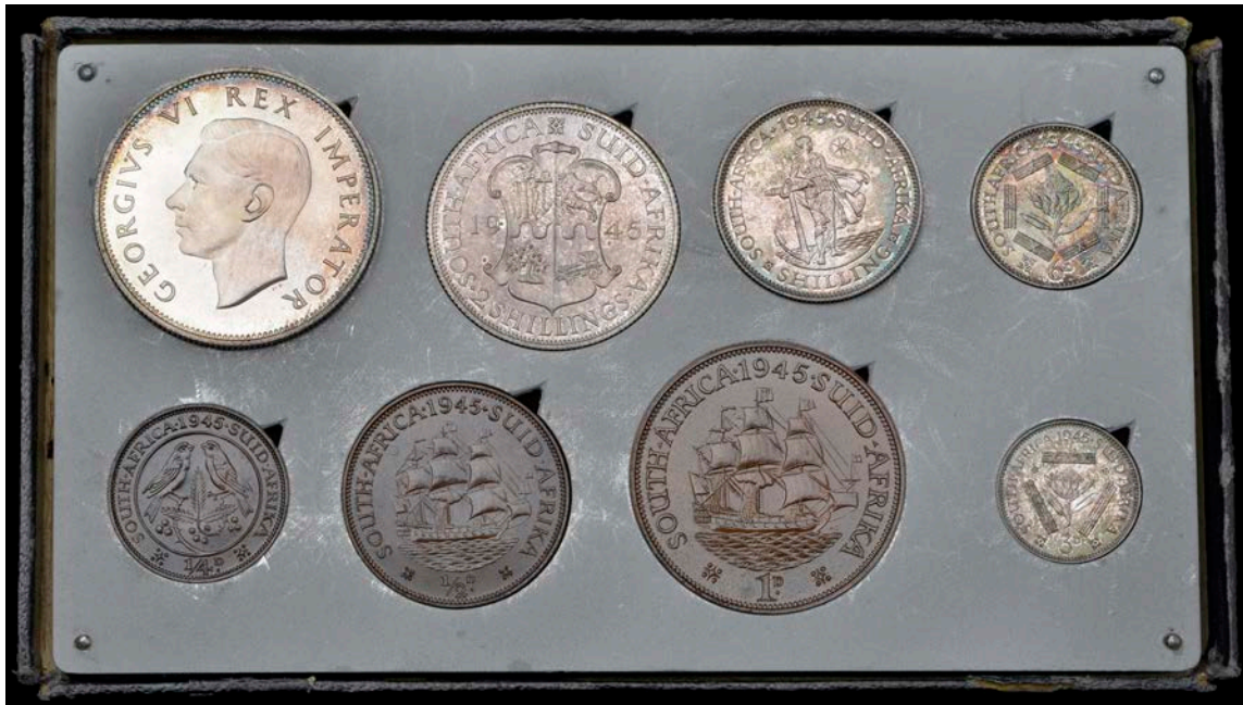
1405 George VI, Proof set, 1945, comprising Halfcrown to Farthing (Hern P18; KM. PS17) [8]. Light scratch on obverse of Shilling, otherwise about as struck, toned; in card case of issue [this slightly damaged] £600-800 150 sets issued