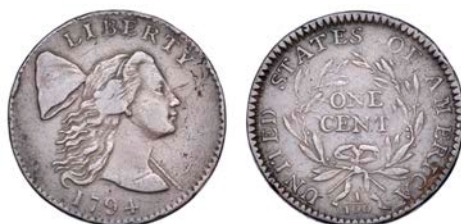
1465 Cent, 1794, head of 1794, lettered edge (Sheldon 29). Light score in front of nose and scratch on neck, otherwise very fine or better, rare