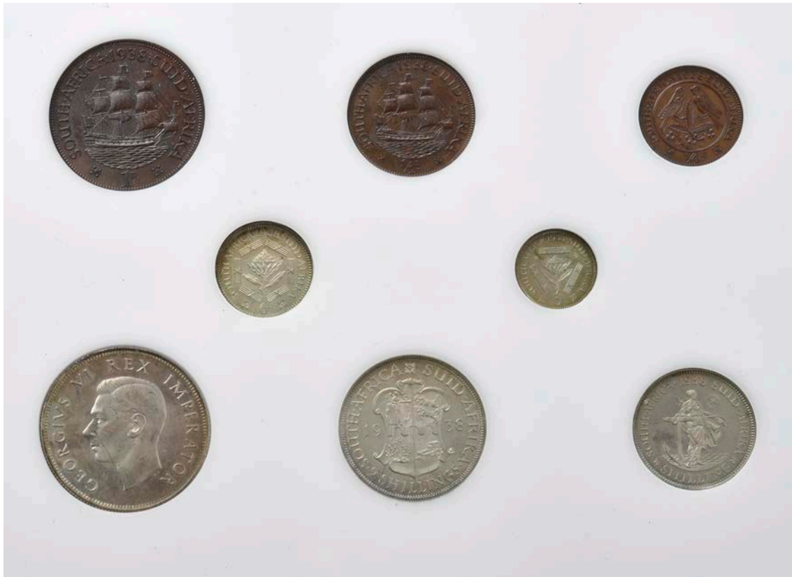
1400 George VI, Proof set, 1938, comprising Halfcrown to Farthing (Hern P14; KM. PS12) [8]. Silver a little dull, otherwise about as struck; in perspex fitted case £1,200-1,500

Provenance: J.J. Pittman Collection, Part III, David Akers Auction (Rosemont, USA), 6-8 August 1999, lot 4848.