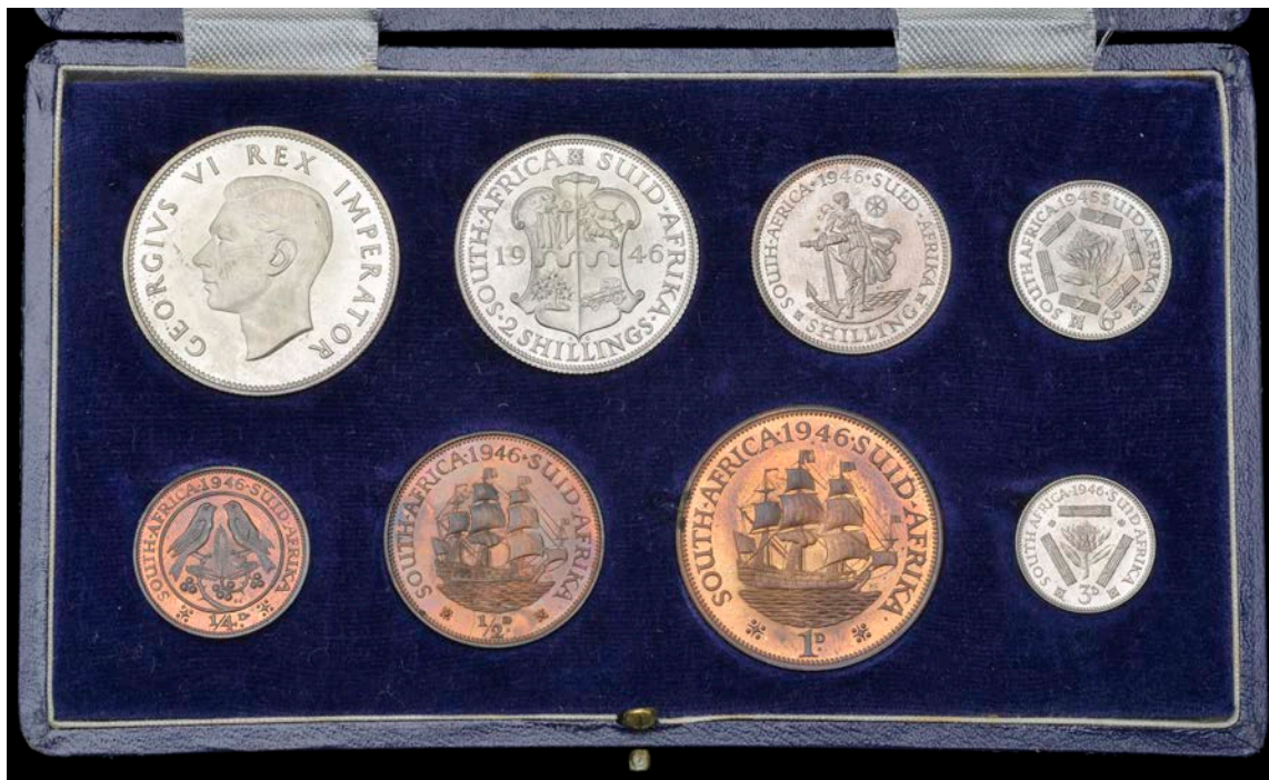
1407 George VI, Proof set, 1946, comprising Halfcrown to Farthing (Hern P19; KM. PS18) [8]. About as struck, silver a little tarnished; in SAM leather case £600-800