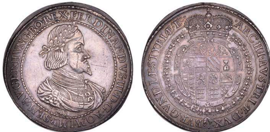
3397 Ferdinand III , Broad Double-Thaler, 1641, Graz, 57.55g/12h (KM. 876.1; Dav. A3186). Suspension ring removed at 12 o'clock and some light surface marks and cracks, otherwise good very fine and lightly toned, still an impressive piece