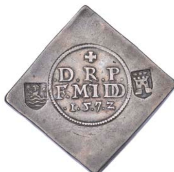
3483 MIDDELBURG , Siege coinage, uniface Velddaalder of 36 Stuivers, 1572, D R P F M I D D, date below, all within border, countermark of Zeeland to left, Middelburg to right, 28.69g (VG 36; Delmonte 165). Good very fine, toned, scarce

Provenance: Jean Elsen Auction 106 (Brussels), 11 September 2010, lot 954