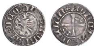
3435 POMERANIA, Wolin, Witten, c. 1400, griffin rampant left, two stars in field, DA GLORIAM DEO, rev. cross, star and crown (?) in angles, MONETA VOLLIN, 1.19g/5h (Jesse -). About very fine, UNIQUE £500-700

Wolin is a small seaport on the southern shore of the Baltic Sea, on the border between present-day Germany and Poland. Found in England, this is the only specimen of a mediaeval Hanseatic coin from the town. Its size and weight are similar to other Hanseatic witten, while its design resembles the coinage of the nearby town of Greifswald