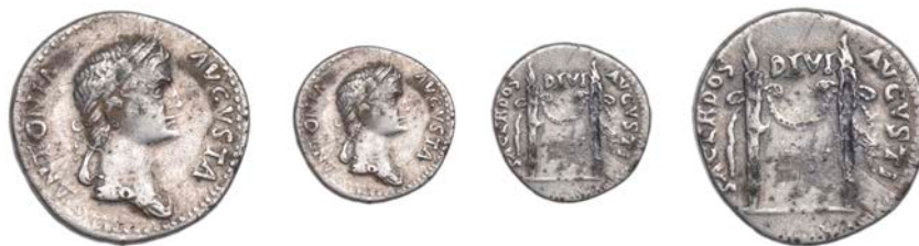
3057 Antonia (†37) Denarius, Rome, 41-2, draped bust right, wearing wreath of grain ears, rev. two lighted torches joined by a garland, 2.59g/3h (RIC Claudius 68; BMC 114; BN 15-17 var. [Aureus]; RSC 5). Possibly plated, otherwise good fine, rare £400-500

Provenance: Baldwin/Markov/M & M Auction 12 (New York), 11 January 2006, lot 255