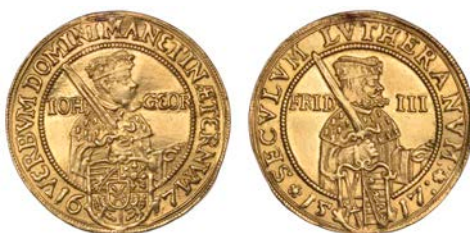
3445 SAXONY, Johan Georg , 2 Ducats, 1617, Dresden, Centenary of the Reformation, 6.83g/12h (F 2662). Mount removed at 12 o'clock, slightly creased and fields tooled, otherwise nearly extremely fine, rare £800-1,000