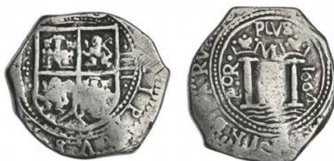
3495 Philip IV , 4 Réales, 1664PoR, Nuevo Reino [Santa Fe], crowned shield, rev. NR between two crowned columns, moneyer's mark vertically to left, date to right, 8.78g/2h (Calicó -; Cayón -; KM. -). A little weak in centre, otherwise good fine, the type extremely rare, the date unpublished in the main references, possibly the only known specimen