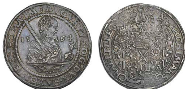
3437 SAXONY, August I, Thaler, 1564 HB , Dresden, 28.86g/11h (KM. -; Dav. 9795). Very fine or better, toned £150-200