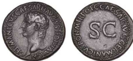
3056 Germanicus , commemorative As, Rome, c. 37-8, bust left, rev. C CAESAR AVG GERMANICVS PON M TR POT around large s c, 11.18g/6h (CBN 73; RIC 35; C 1). Very fine, dark brown patina £250-300