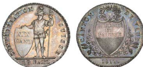
3507 VAUD, 10 Batzen, 1811 (DT 226; KM. 15). Good extremely fine, attractively toned

Slabbed in large NGC holder, graded MS 63