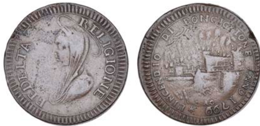
3281 RONCIGLIONE, Austrian Occupation , 3 Baiocchi, 1799 (KM. 6). Fine, very rare £200-250