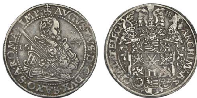
3440 SAXONY, August I , Thaler, 1577 HB , Dresden, 28.97g/2h (KM. 208; Dav. 9798). About very fine £100-150