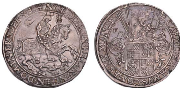
3434 MANSFELD-BORNSTÄDT, Karl Adam, Thaler, 1655 HP-K , Eisleben, 28.75g/1h (KM. 98; Dav. 6930). Scratched in obverse field, otherwise good very fine £100-150