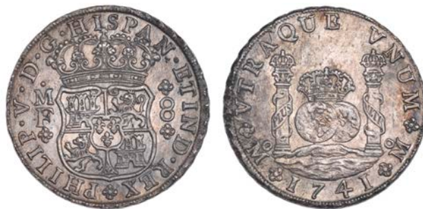
3477 Philip V , 8 Réales, 1741 FM , Mexico City (Cayón 9427; KM. 103). Nearly extremely fine