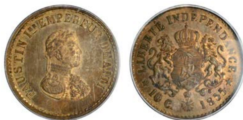
3454 Faustin I , Pattern 10 Centimes, 1855, unsigned, in copper, laureate uniformed bust right, rev. crowned arms and supporters, edge plain, 6h (KM. Pn69; cf. R. Byrne 603). Trifling spots on reverse, otherwise virtually as struck £120-150