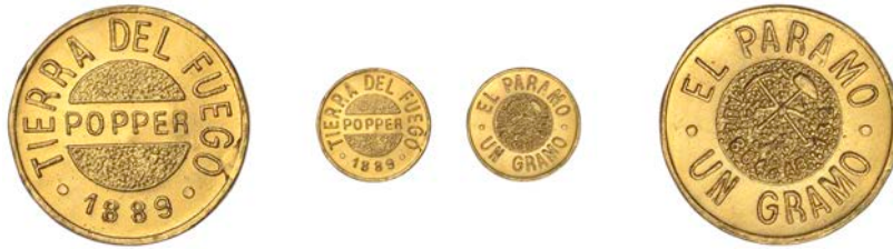
3381 TIERRA DEL FUEGO, Julius Popper, Gramo, 1889 (KM. Tn5; F 2). Trace of being removed from mount and has possibly been gilt, otherwise very fine and very rare £400-500