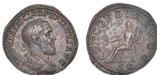
3070 Pupienus (238), Sestertius, Rome, laureate, draped, and cuirassed bust right, rev. Concordia seated left, 23.94g/2h (RIC 20). Better than very fine, brown patina £500-700