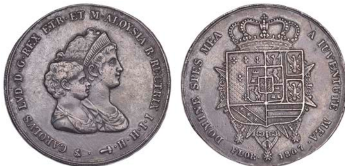
3468 TUSCANY, Carlo Luigi and Maria Louisa , Francescone (10 Paoli), 1807, Pisa (KM. C50.1; Dav. 155). Very fine or better £100-150