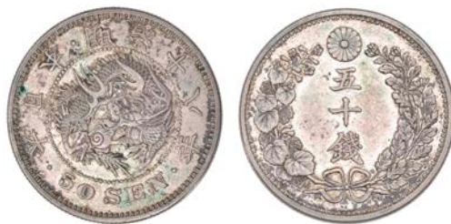
3285 Mutsuhito , 50 Sen, Meiji 18 [1885] (KM. Y25). Good very fine, rare £150-200