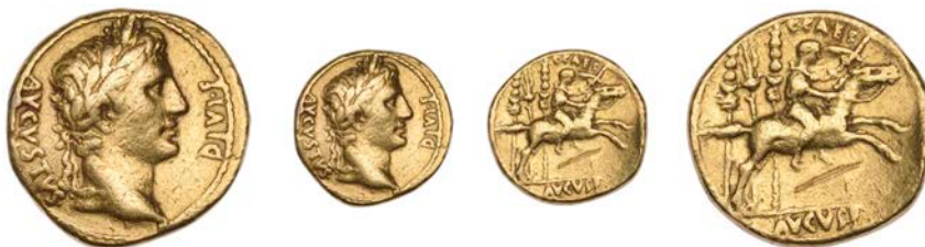
3053 Augustus (27 BC-14 AD), Aureus, Lugdunum, 8 BC, laureate bust right, rev. Caius Caesar galloping right, holding a sword in right hand and shield in left, behind, aquila between two standards, 7.74g/6h (Calicó 174a; RIC 198; C 39). Slightly bent, otherwise good fine, rare £800-1,000