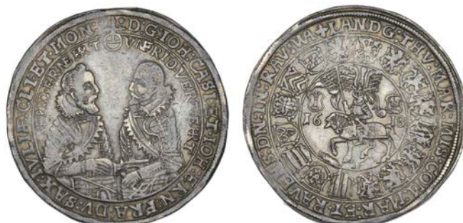
3436 SAXE-COBURG-EISENACH, Johann Casimir and Johann Ernst, Thaler, 1618 WA , Saalfeld, 28.95g/4h (Dav. 7429). Nearly very fine, toned £150-200

Wolin is a small seaport on the southern shore of the Baltic Sea, on the border between present-day Germany and Poland. Found in England, this is the only specimen of a mediaeval Hanseatic coin from the town. Its size and weight are similar to other Hanseatic witten, while its design resembles the coinage of the nearby town of Greifswald