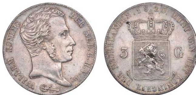
3480 Willem I , 3 Gulden, 1820, Utrecht (KM. 49). A few small surface marks, otherwise good very fine