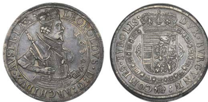
3399 TYROL, Archduke Leopold , Thaler, 1632, Hall, 28.18g/12h (KM. 629.2; Dav. 3338). Good very fine, toned