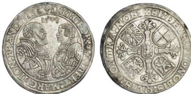
3429 BRANDENBURG-FRANKEN, Georg and Albrecht Alcibiades , Thaler, 1540, Schwabach, 29.00g/1h (Dav. 8967). Some traces of deposit, otherwise about very fine £200-250