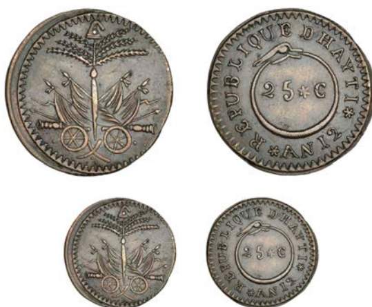
3453 Alexandre Pétion , Pattern 25 Centimes, AN 12 [1815], unsigned, in copper, flags and military trophies under palm tree, rev. value in torque, edge plain, 1.86g/6h (KM. –; cf. R. Byrne 617, same dies). Obverse slightly off-centre, otherwise good very fine, extremely rare £4,000-4,500