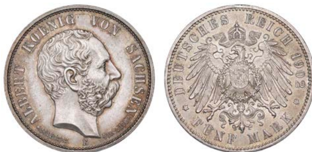
3448 SAXONY, Albert , 5 Marks, 1902 E (KM. 1256; Dav. 902). Virtually mint state £120-150