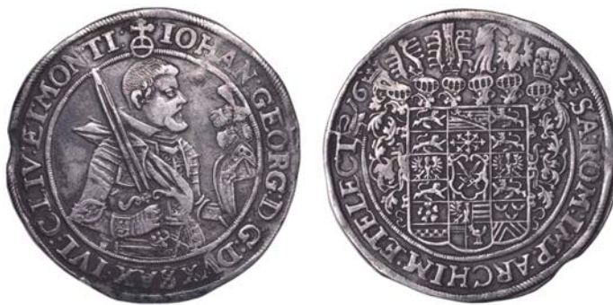
3446 SAXONY, Johan Georg , Thaler, 1623, mm. swan, 28.63g/10h (Dav. 7601; KM. 132). Nearly very fine £90-120