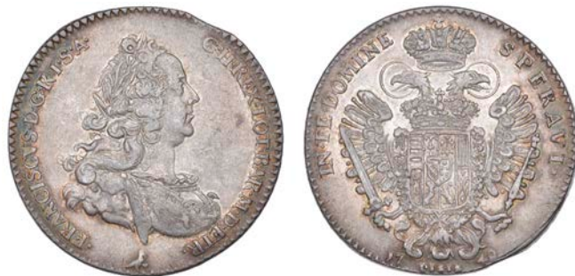
3467 TUSCANY, Francis I , Francescone (10 Paoli), 1748 (KM. C 8b; Dav. 1507). About extremely fine, lightly toned £150-200