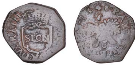
3278 NAPLES & SICILY, Neapolitan Republic , 3 Tornesi, 1648, 7.50g/3h (KM. 88). About very fine, rare £120-150