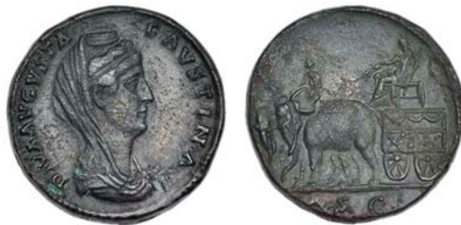
3065 Diva Faustina Senior (consecrated 141), Sestertius, Rome, after 141, draped bust right, hair coiled on top of head, rev. Empress seated left holding sceptre in car drawn left by two elephants with riders, 24.85g/12h (RIC Antoninus Pius 1113; C 57). Has been tooled, otherwise about very fine, reverse better, very rare £300-400