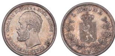
3492 Oscar II , Krone, 1900 (KM. 357). Virtually as struck, toned, the surfaces proof-like