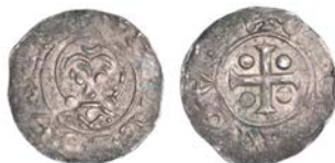
3473 UTRECHT, Bishopric , Bernold, Denar, Deventer, 1.10g/8h (Dann. 571-2). Legends flat in places, otherwise very fine £100-150