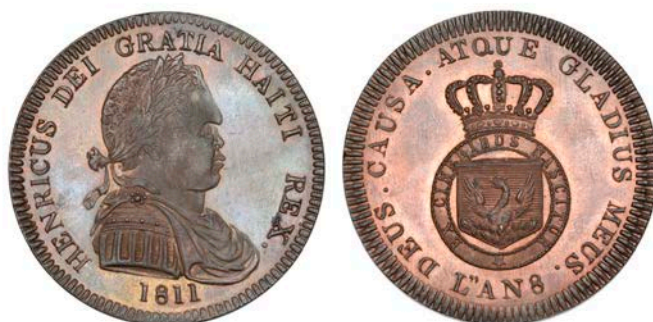
3452 Henri Christophe , Trial striking for a Crown, 1811, in copper, unsigned, thin laureate armoured bust right, hair incomplete at top and by forehead, rev. crowned arms, edge plain, 29.36g/12h. Brilliant mint state, extremely rare £4,000-5,000