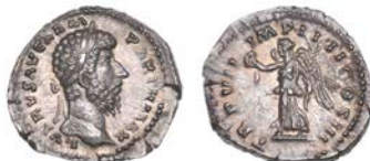
3066 Lucius Verus (161-9), Denarius, Rome, c. 167, laureate bust right, rev. Victory, draped, advancing left, holding wreath in outstretched right hand and cradling palm frond in left arm, 3.45g/12h (RIC Aurelius 574; RSC 295). Edge a little ragged, otherwise extremely fine £90-120