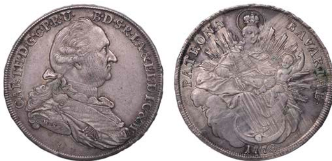
3428 BAVARIA, Karl Theodor , Thaler, 1778 HS (KM. 563.1; Dav. 1964). Some adjustment marks on reverse, otherwise very fine or better £90-120