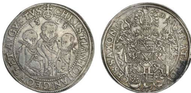
3441 SAXONY, Christian II, Johann Georg and August , Thaler, 1593 HB , Dresden, 29.09g/3h (KM. 314; Dav. 9820). Almost very fine £90-120