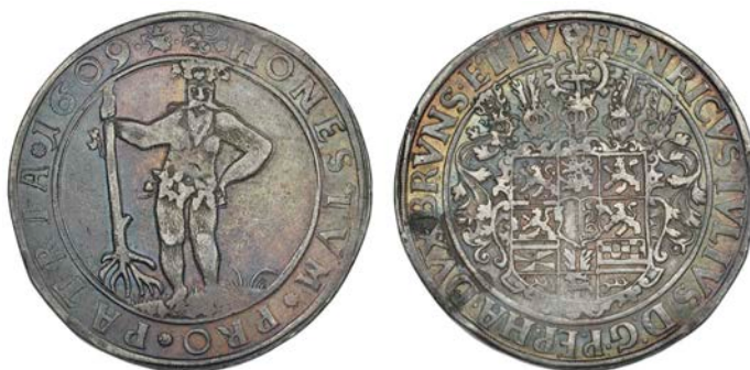
3430 BRUNSWICK-WOLFENBÜTTEL, Heinrich Julius , Reichsthaler, 1609, Zellerfeld, 29.03g/12h (KM. 7; Dav. 6285). Good fine £100-150