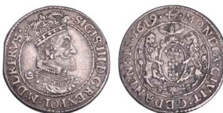
3497 DANZIG , Quarter-Thaler, 1619/8 sb, 5.78g/12h (KM 14). Light scratch in obverse field, otherwise very fine