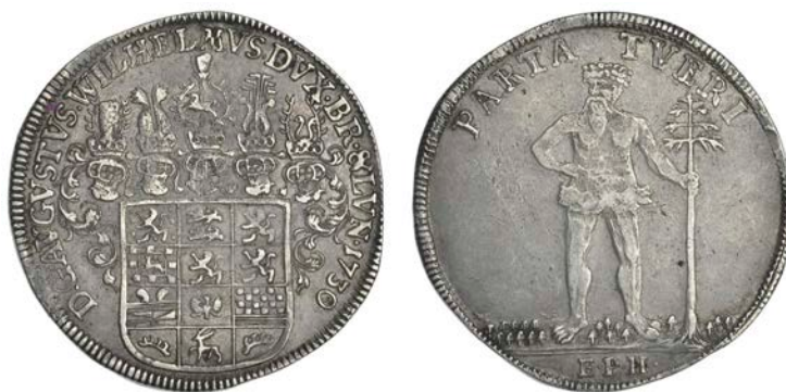
3431 BRUNSWICK-WOLFENBÜTTEL, August Wilhelm , Thaler, 1730 EPH , Zellerfeld (KM. 739; Dav. 2126). About very fine £200-250