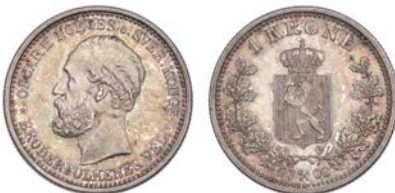
3493 Oscar II , Krone, 1900 (KM. 357). A few minor surface marks and a slight scuff on reverse, otherwise virtually mint state, attractively toned