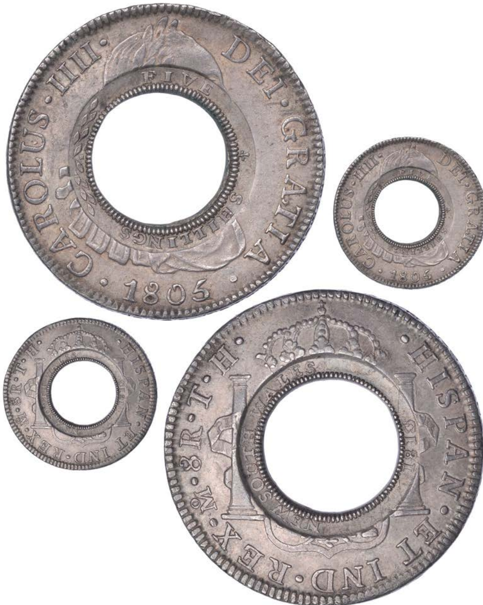
3382 NEW SOUTH WALES, Five Shillings or Holey Dollar, 1813, a MEXICO, Charles III, 8 Réales, 1805 TH , Mexico City, obv. countermarked FIVE + SHILLINGS, double twig of leaves below, rev. countermarked NEW SOUTH WALES 1813, dies A/12 and I/6, 21.34g/12h (Mira/Noble 1805/13, this coin ; Spalding 147; KM. 2.9). Coin about extremely fine, countermarks better, olive-grey tone, very rare and one of the finest examples remaining in private hands £60,000-80,000

Provenance: H.D. Gibbs Collection, Hans Schulman Auction (New York), 19 November 1960, lot 446; A. Chesser Collection [bt Spink]