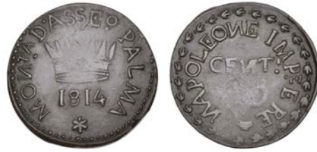
3279 PALMA NOVA , Siege coinage, 50 Centesimi, 1814 (Mailliet xc, 1; KM. C2). Centres weak, otherwise good very fine, scarce £120-150