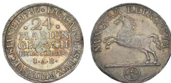
3432 BRUNSWICK-WOLFENBÜTTEL, Karl I , Two-Thirds-Thaler, 1739 IAB , Zellerfeld (KM. 895). Good very fine, toned £100-150