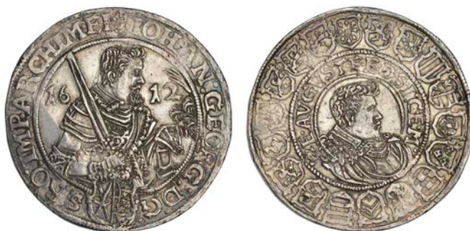
3444 SAXONY, Johann Georg I and August , Thaler, 1612, Dresden, mm. swan, 29.02g/6h (Dav. 7573; KM. 44). Good very fine £150-200