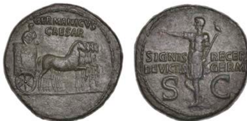
3055 Germanicus (†AD 19), commemorative Dupondius, Rome, c. 37-41, Germanicus in ornated slow quadriga right, rev. Germanicus advancing left, raising hand and holding legionary eagle, 15.60g/8h (CBN 140; RIC 57; C 7). Extremely fine, dark green patina £500-600

Provenance: Baldwin/Markov/M & M Auction 12 (New York), 11 January 2006, lot 256