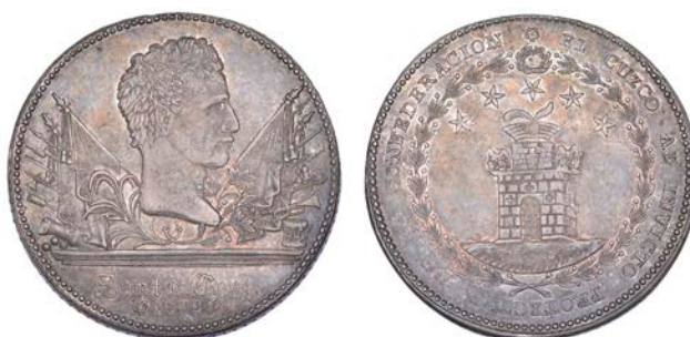
3496 General Santa Cruz , Proclamation Peso, 1838, Cuzco, head right between banners, rev. castle within wreath (Fonrobert 9235). Extremely fine, toned, scarce