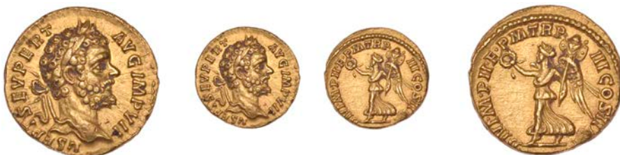
3067 Septimus Severus (193-211), Aureus, Rome, 195, laureate bust right, rev. Victory advancing left, holding wreath and trophy, 7.20g/12h (Calicó 2448; RIC 66). Reverse edge nick at 5 o'clock, otherwise good very fine, superb portrait, rare £3,000-3,500