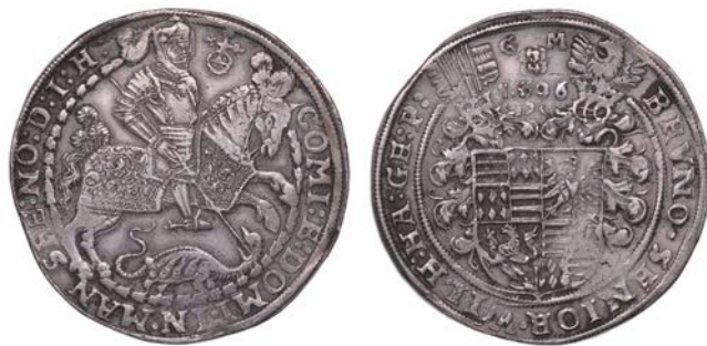
3433 MANSFELD-BORNSTÄDT, Bruno II, Wilhelm I, Johann Georg IV and Volrath VI, Thaler, 1606 GM , Eisleben, 29.04g/5h (Dav. 6916). Good very fine £200-250