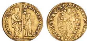
3470 VENICE, Nicolo da Ponte (1578-85), Zecchino, 3.48g/7h (Paolucci 1; F 1267). Good fine or better £150-200