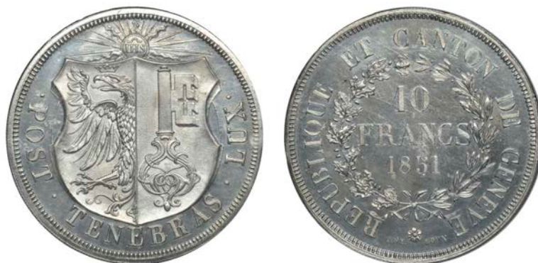
3506 GENEVA, City, 10 Francs, 1851 (DT 279; KM. 138; Dav. 374). A few light hairlines, otherwise about mint state £1,200-1,500

Slabbed in large NGC holder, graded MS 63