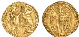
3469 VENICE, Andrea Dandolo (1343-54), Ducato, 3.47g/6h (Paolucci 1; F 1221). Slightly creased, otherwise good fine £150-200