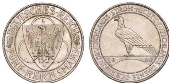
3450 WEIMAR REPUBLIC , 5 Marks, 1930 A , Rhineland (KM. 71). Rim nick, otherwise about extremely fine £100-150