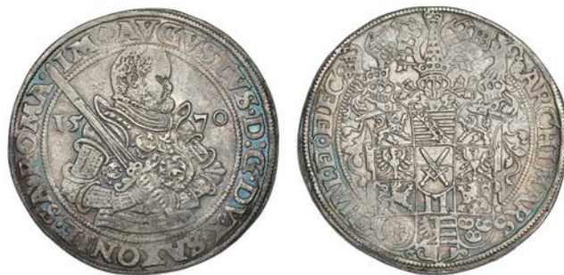
3438 SAXONY, August I , Thaler, 1570 HB , Dresden, 28.68g/11h (KM. 208; Dav. 9798). About very fine £100-150