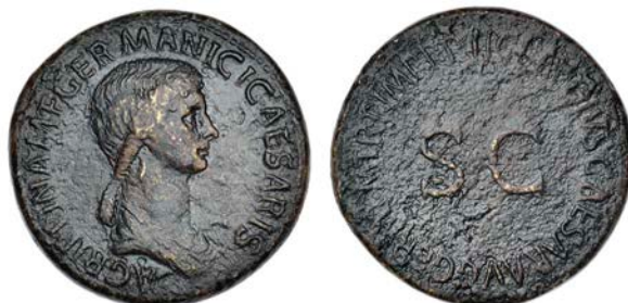
3058 Claudius (41-54), Sestertius, Rome, 50-4, in the name of Agrippina Senior, bust right with hair in long plait, rev. sc, 27.15g/6h (RIC 102; BMC 219; Sear 1906). Has been tooled, obverse about fine, reverse corroded but clear, very rare £200-250