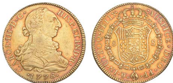
3478 Charles III , 8 Escudos, 1778 FF , Mexico City (Cayón 12897; KM. 156.2; F 33). Good very fine with red tone