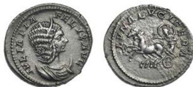
3068 Julia Domna (Augusta 193-217), Antoninianus, Rome, 215, diademed and draped bust right, set on crescent, rev. Luna driving biga left, fold of drapery floating around and above head, 4.45g/6h (RIC 379a). Surface a little porous, otherwise better than very fine £80-100