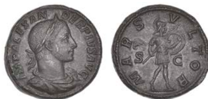
3069 Severus Alexander (222-35), As, Rome, c. 231-5, laureate, draped and cuirassed bust right, rev. Mars advancing right, carrying spear and shield, 10.14g/12h (RIC 637; C 170). Extremely fine, dark green patina £300-350 Provenance: Baldwin/Markov/M & M Auction 12 (New York), 11 January 2006, lot 318