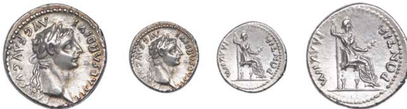
3054 Tiberius (14-37), Denarius, Lugdunum, c. 30, laureate bust right, rev. Livia seated right on chair, feet on footstool, holding sceptre and olive branch, 3.66g/6h (CBN 28; RIC 30; RSC 16a). Extremely fine, toned £400-500