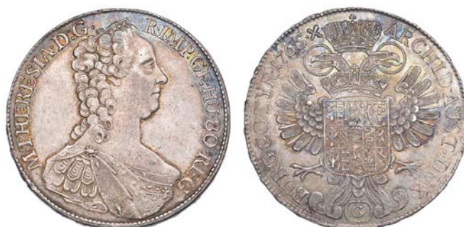
3398 Maria Theresa , Thaler 1765, Günzburg (Dav. 1147). About extremely fine, lightly toned

Provenance: Spink Auction, 30 September 2010, lot 665