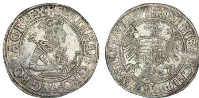
3396 Ferdinand I , Thaler, undated, Linz, 28.66g/12h (Dav. 8014). Nearly extremely fine