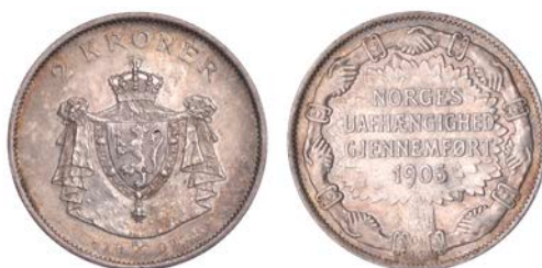
3494 Haakon VII , 2 Kroner, 1907 (KM. 366). About extremely fine