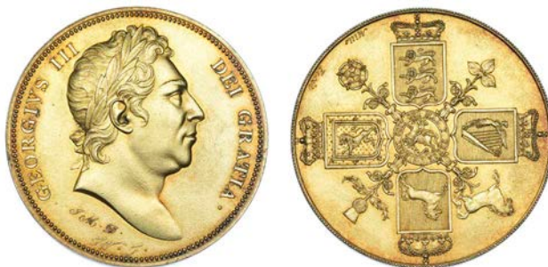
531 Pattern Crown, undated [1820], by G. Mills and T. Webb for J. Mudie, in silver, laureate bust right, rev. cruciform shields, lesser George in centre, national emblems in angles, edge plain, 27.90g/12h (L & S 214; ESC 221). Has been fire-gilt, some surface marks, otherwise good extremely fine, rare £1,000-1,200