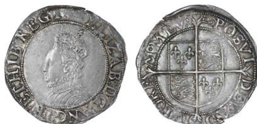
217 Shilling, mm. key, bust 6B, 6.12g/1h (N 2014; S 2577). Reverse slightly off-centre, otherwise good very fine, attractively toned £300-400