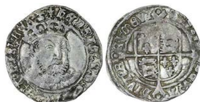
179 Third coinage, Groat, Tower, mm. lis, bust 2, Lombardic lettering, pellet-in-annulets in forks, trefoil stops, 2.54g/4h (Whitton B1; N 1844; S 2369). Nearly very fine £150-200