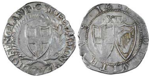
291 Shilling, 1656, mm. sun on obv. only, no stop after COMMONWEALTH , second M over F , OF divided by stop, 5.79g/1h (cf. ESC 995C; N 2724; S 3217). Very fine, an apparently unrecorded variety £350-450