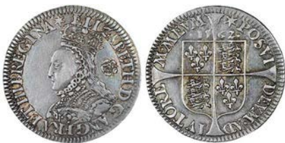
235 Sixpence, 1562, mm. star, bust D, rev. cross pattée, toothed borders, 2.80g/7h (Borden and Brown 29, O4/R2; N 2028; S 2597). Very fine or better, grey tone £150-200