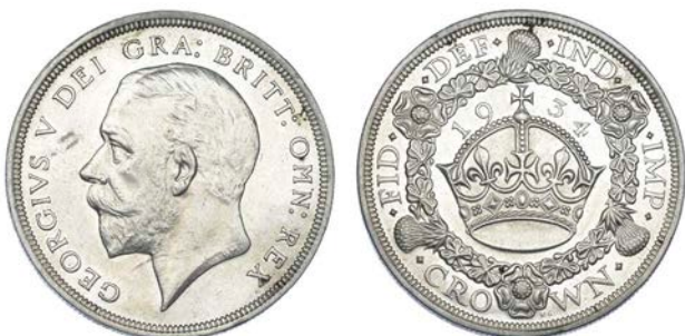
647 Crown, 1934 (ESC 374; S 4036). Of bright appearance, extremely fine or better, very rare £3,500-4,000