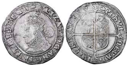
220 Sixpence, 1592, mm. hand, bust 6C, 2.94g/10h (N 2015; S 2578B). Weak on first part of date, otherwise better than very fine £180-220