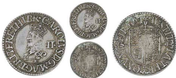
254 Halfgroat, no mm, signed B below bust, 1.01g/6h (SCBI Brooker 721, same dies; N 2302; S 2856). Some adjustment marks, otherwise good very fine with attractive dark tone £80-100