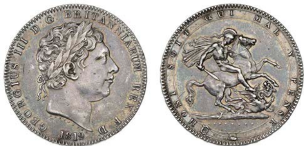
526 Crown, 1819, edge LIX (ESC 215; S 3787). Small dig on face, otherwise better than very fine, toned £90-120