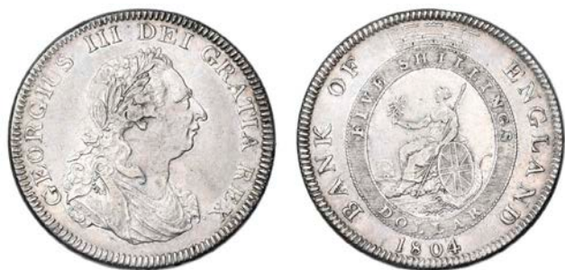
518 Dollar, 1804, types A/2 (ESC 144; S 3768). About very fine £90-120