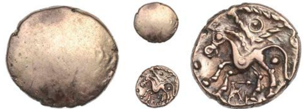
320 Uninscribed issues, Quarter-Stater, Late Weald type, similar, 1.38g (ABC 198; BMC 2469-70; VA 151; S 172). Very fine or better £200-250