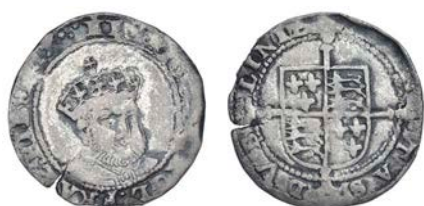
806 Henry VIII , Posthumous coinage, Sixpenny Groat, type IV, Dublin, mm. unclear, late Tower bust, 2.35g/8h (S 6488; DF 218). Good fine £250-300

Provenance: Glendining Auction, 19 March 1986, lot 320; L. LaRiviere Collection, Spink Auction 178, 22 February 2006, lot 88; S.A. Bole Collection, DNW Auction 93, 26 September 2011, lot 1529