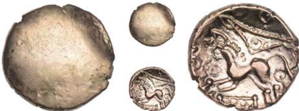
314 Uninscribed issues, Quarter-Stater, Late Weald type, similar, 1.35g (ABC 198; BMC 2469-70; VA 151; S 172). Good very fine £250-300