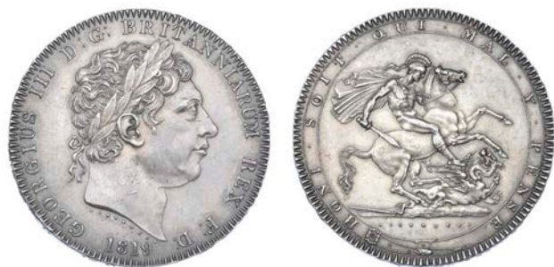
529 Crown, 1819, edge LIX (ESC 215; S 3787). Scuffed and cleaned at some time, now toned, minor surface marks, otherwise good very fine £90-120