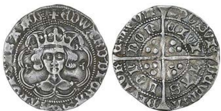
154 Heavy coinage, Groat, classes I/II, mm. plain cross on obv., rose on rev., lis on breast, pellets by crown, 3.74g/3h (B & W Ibii/IIvi; N 1530/1531; S 1971/1972). Obverse nearly very fine, reverse better £250-300