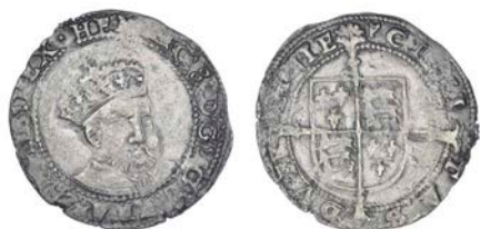
805 Henry VIII (1509-47), Posthumous coinage, Sixpenny Groat, type IV, Dublin, mm. harp on rev. only, late Tower bust, 2.66g/9h (S 6488; DF 218). Very fine for issue with a strong portrait £600-800

Provenance: Glendining Auction, 19 March 1986, lot 320; L. LaRiviere Collection, Spink Auction 178, 22 February 2006, lot 88; S.A. Bole Collection, DNW Auction 93, 26 September 2011, lot 1529