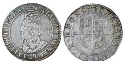
257 Sixpence, mm. anchor and mullet on obv. , anchor on rev. , 2.88g/6h (SCBI Brooker 729 obv. /732 rev. , same dies; N 2306; S 2860). Hairline scratches both sides, otherwise very fine £90-120