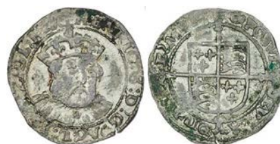
183 Posthumous coinage, Groat, Tower, mm. grapple on rev. only, bust 5, Roman lettering, roses in forks, pellet stops, 2.75g/1h (Whitton d; N 1871; S 2403). A few spots of verdigris, otherwise about very fine for issue £200-300