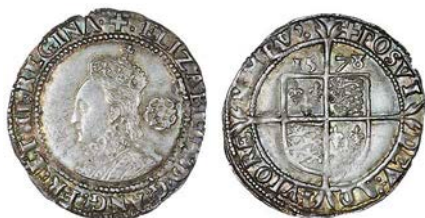
211 Sixpence, 1578, mm. Greek cross, bust 5A, 3.10g/11h (N 1997; S 2572). About extremely fine, attractively toned £300-400