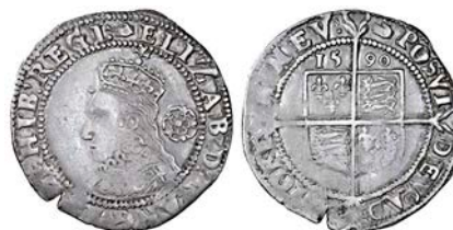
219 Sixpence, 1590, mm. hand, bust 6C, 3.08g/10h (N 2015; S 2578B). Small striking split, otherwise about very fine, lightly toned £120-150