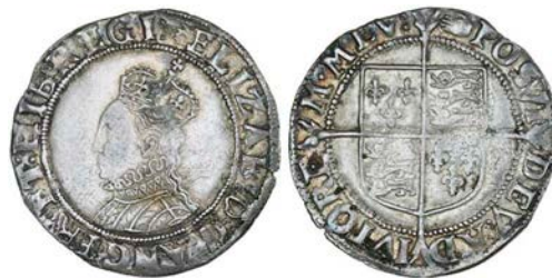
214 Shilling, mm. hand, bust 6B, 5.89g/12h (N 2014; S 2577). A little weak on face, otherwise about very fine, lightly toned £200-250