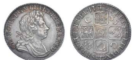
498 Shilling, 1723 SSC, first bust (ESC 1176; S 3647). Extremely fine, toned £120-150