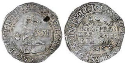
275 Sixpence, 1646, Bridgnorth-on-Severn (?), mm. B on obv. only, 3.02g/6h (Morr. A-1; SCBI Brooker 1131, same dies; N 2523; S 3041). Striking crack at 2 o'clock, otherwise very fine, rare £350-400