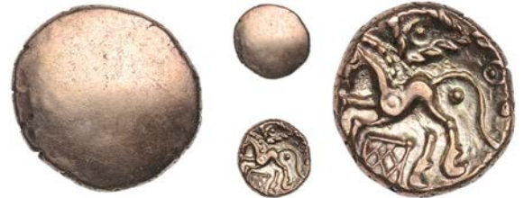
319 Uninscribed issues, Quarter-Stater, Late Weald type, similar, 1.37g (ABC 198; BMC 2469-70; VA 151; S 172). Obverse slightly off-centre, otherwise good very fine £200-250