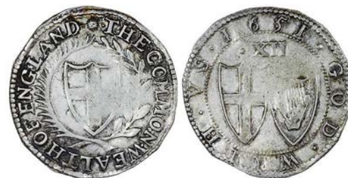
287 Shilling, 1651, mm. sun on obv. only, stop before and after COMMON, no stops by OF, F of OF over D, 5.94g/7h ( cf. ESC 984; N 2724; S 3217). Some traces of lacquer, only fine but very rare, the obverse apparently unrecorded £200-300