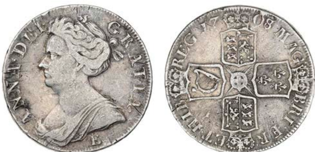
493 Crown, 1708/7 E , second bust, edge SEPTIMO (ESC 107; S 3600). Better than fine, the overdate clear £200-250