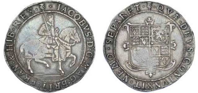
674 Ninth coinage, Sixty Shillings, mm. thistle-head, English arms in first and fourth quarters, 29.81g/9h (SCBI 35, 1360-1; B 1, fig. 972; S 5501). Weak on horse's rump (and corresponding on reverse), otherwise good very fine with old cabinet tone £700-900