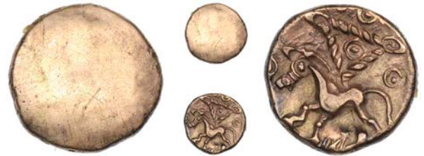
317 Uninscribed issues, Quarter-Stater, Late Weald type, similar, 1.35g (ABC 198; BMC 2469-70; VA 151; S 172). Good very fine £250-300