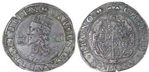
258 Shilling, mm. book, large bust, rev. legend punched over guide line, inner circles, 5.98g/7h (Morr C-3; SCBI Brooker 753-5, same obv. die; N 2331; S 2883). Bust slightly smoothed, otherwise very fine, rare £500-600