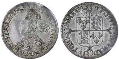
234 Sixpence, 1562, mm. star, bust C, no stops by date, 3.03g/7h (Borden/Brown 24, O3/R5; N 2026; S 2595). Fields lightly tooled, otherwise good very fine £150-200