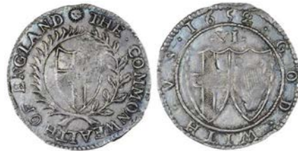
296 Sixpence, 1652, mm. sun on obv. only, no stops by mm., 3.05g/7h (ESC -; N 2726; S 3219). Centres a trifle weak, otherwise good very fine, the absence of stops not recorded in ESC £350-450