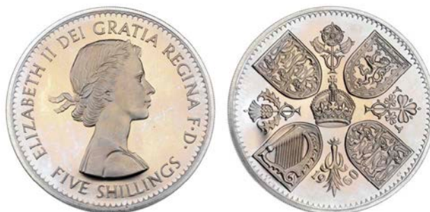
657 Proof Crown, 1960, so-called VIP issue, edge grained, 27.73g/12h (ESC 393M; S 4143). Some marks in obverse field, otherwise brilliant and practically as struck, toned, very rare £400-500