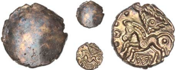
312 Uninscribed issues, Quarter-Stater, Late Weald type, similar, 1.35g (ABC 198; BMC 2469-70; VA 151; S 172). Nearly extremely fine £300-350