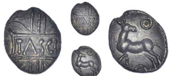
321 Tasciovanus , Unit, TASC I in panel over wreath, rev. deer standing left, looking right, pellet-in-annulet above and below, 1.18g/1h (ABC 2634; BMC –; VA –; S –). Small edge chip, otherwise good very fine, extremely rare £600-800