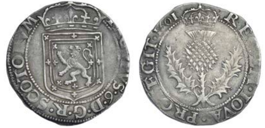
673 Eighth coinage, Thistle Merk, 1601, 6.50g/7h (SCBI 35, 1282-3; SCBI 58, 1560-70; B 1, fig. 943; S 5497). Very fine or better, scarce £200-300