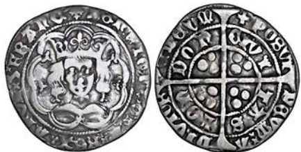
152 Trefoil issue, Groat, London, mm. crosses IIIb/V, leaf on breast, trefoils by neck and after REX, no additional marks on rev., 3.66g/3h (cf. Whitton 31; N 1496; S 1908). Good fine £80-100