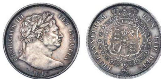
532 Halfcrown, 1817, large head (ESC 616; S 3788). Good extremely fine, lightly toned £150-200