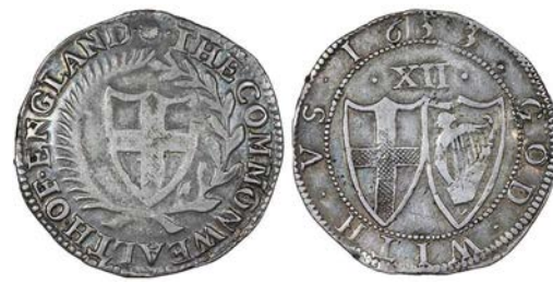
289 Shilling, 1653, mm. sun on obv. only, no stop after THE, 5.69g/5h (ESC 988A; N 2724; S 3217). Nearly very fine, rare £200-250