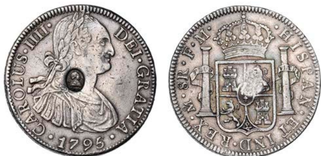
517 MEXICO, Charles III, 8 Réales, 1795 FM , Mexico City, obv. countermarked with head of George III in oval (ESC 129; S 3765A). Some obverse surface marks, otherwise about very fine, countermark better £250-350