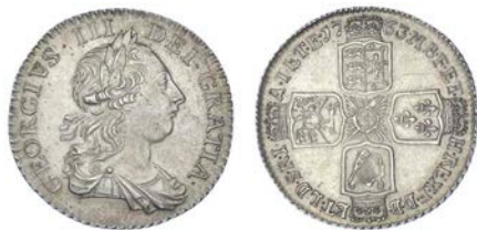
513 Shilling, 1763 (ESC 1214; S 3742). Extremely fine or better but with minor hairline scratch in third quarter of reverse, attractively toned £1,000-1,200