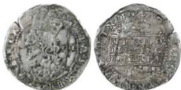
267 Groat, 1644, no mm., large bust to bottom edge, lion's head on shoulder, no plume in field, rev. Declaration, Shrewsbury plume between two lis above, date and ox below, inverted A for V of DEVS, 2.00g/11h (Morr. C-2; SCBI Brooker -; N 2465; S 2987). Striking crack at 11 o'clock and creased, otherwise very fine £150-200