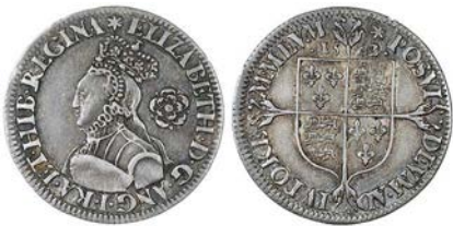
232 Sixpence, 1562, mm. star, bust B, 3.16g/6h (Borden and Brown 23, O6/R5; N 2025/2; S 2594). Good very fine with attractive tone £250-300