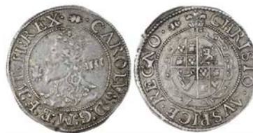
260 Groat, mm. book, large bust, rev. plume without bands, 1.99g/7h (Morr. A-1; SCBI Brooker 763, same rev. die; N 2337; S 2891). Very fine £90-120