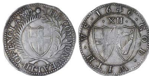
286 Shilling, 1649, mm. sun on obv. only, first N of ENGLAND OVER G, 5.98g/6h ( cf. ESC 982; N 2724; S 3217). Centres weak, otherwise very fine, rare, the corrected error not recorded in ESC £300-400