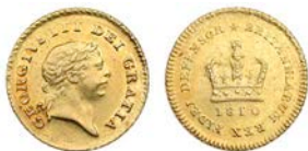
512 Third-Guinea, 1810, second bust (MCE 460; S 3740). Very fine or better £100-150