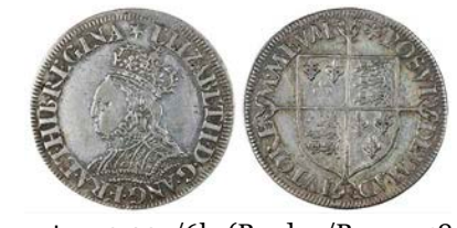
240 Groat, mm. star, 2.02g/6h (Borden/Brown 18, O1/R1; N 2032; S 2601). Very fine and lightly toned, very rare £400-500