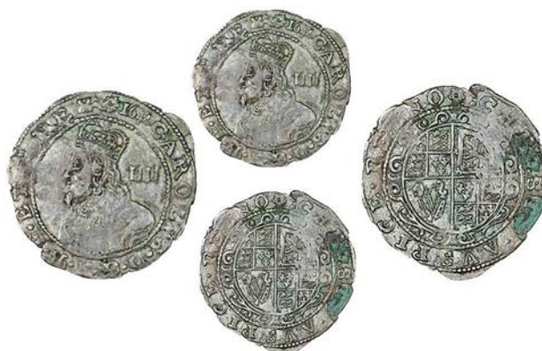
278 Groat, 1644, mm. rose, 1.66g/4h (Besly A-1; SCBI Brooker 1071, same dies; N 2579; S 3088). Striking splits at 8 and 10 o'clock and some verdigris on reverse, otherwise nearly very fine £150-200