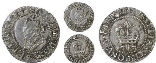
264 Penny, mm. book, reads CAROLVS, rev. plume, inner circles, 0.51g/9h (Morr. C-2; SCBI Brooker 786B, same dies; N 2347; S 2905). Pierced at 3 o'clock, otherwise very fine £60-80