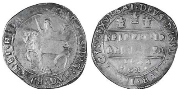
266 Halfcrown, 1644, mm. Oxford plume on obv. only, Briot horseman, three Oxford plumes above Declaration, 14.59g/5h (Bull 615/1; Morr. E-1; SCBI Brooker 908, same dies; N 2424; S 2958A). Fine £200-250