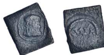
814 Confederate Catholics , Farthing, Cork, 3.08g/12h (S 6562A). Fine, very rare £800-1,000