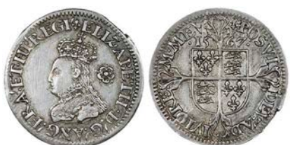
237 Sixpence, 1567, mm. lis, bust F, reads REGI', 3.04g/7h (Borden/Brown 37, O3/R4; N 2030; S 2599). Fields tooled, otherwise good very fine £200-250

In an early die state, where the flaw at FRA is no more than a small swelling between R and A