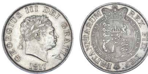
535 Halfcrown, 1817, small head (ESC 618; S 3789). Extremely fine or better, but two marks below chin £120-150