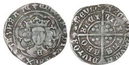
160 Light coinage, Groat, York, class VII, mm. lis, quatrefoils by neck, fleurs on cusps except above crown, E on breast, saltire stops, 2.99g/8h (B & W VIIb; N 1583; S 2012). Good fine £80-100