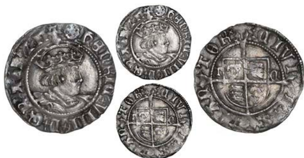
175 Second coinage, Halfgroat, Canterbury, Abp Cranmer, mm. catherine wheel on obv. only, tc by shield, 1.30g/8h (Whitton vi; N 1803; S 2344). Very fine, toned £90-120