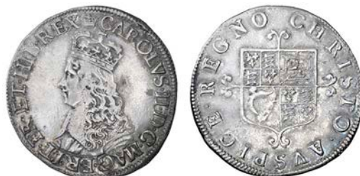
299 First issue, Shilling, mm. crown on obv. only, 5.93g/3h (ESC 1010; N 2762; S 3308). Dig behind head, otherwise nearly very fine £500-700