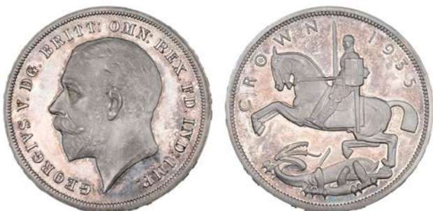
649 Proof Crown, 1935, error edge DECUS ANNO REGNI ET TUTAMEN xxv, 28.34g/12h (ESC 380; S 4050). Minimal hairlining, otherwise practically as struck and lightly toned, very rare £1,200-1,500