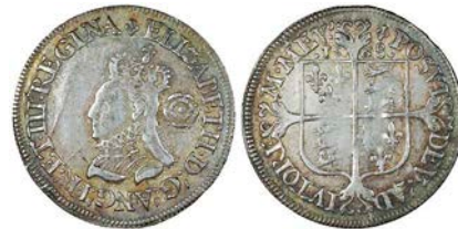
238 Sixpence, 1568, mm. lis, bust F, reads REGINA, 3.08g/6h (Borden/Brown 40, O1/R2; N 2030; S 2599). A little weak in centres, otherwise nearly very fine £150-200