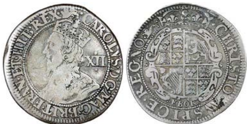
281 Shilling, Gp 2 [type 4], mm. lion, 4.85g/12h (Besly 2Cc; SCBI Brooker 1094, same dies; N 2319; S 2873). Some scratches, otherwise obverse fine, reverse better £90-120