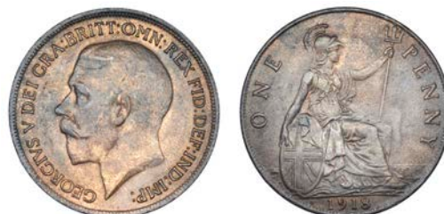
656 Penny, 1918 H (Freeman 183; BMC 2253; S 4052). A little weak, otherwise extremely fine, obverse with original colour £200-250