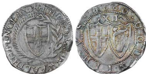
293 Shilling, 1660, mm. anchor on obv. only, 5.97g/4h (ESC 1001; N 2725; S 3218). Some very light tooling, otherwise very fine and very rare £600-800