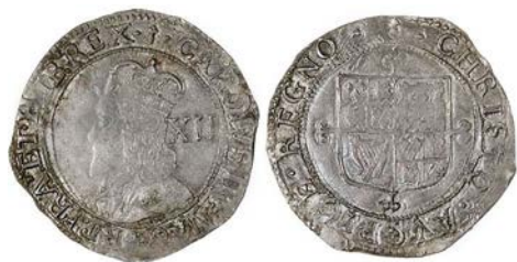
253 Shilling, Gp G, mm. sceptre, bust 3, shield 2, 6.17g/2h (Sharp H3/2; cf. SCBI Brooker 569; N 2234; S 2819). Centres weak, otherwise fine £120-150