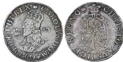
259 Sixpence, mm. book, rev. stop before legend, no inner circles, 2.69g/1h (Morr. A-1; SCBI Brooker 758-9, same obv. die; N 2333; S 2886). Very fine, rare £400-500