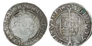
181 Third coinage, Halfgroat, Bristol, mm. WS on rev. only, local bust, Lombardic letters both sides, trefoils in forks, pellet stops, rose after CIVITAS and trefoil (?) before BRISTOLIE, pellet below shield in third quarter and on inner circle (?), 1.19g/2h (Whitton 2; N 1851; S 2377). Good fine or better £150-200