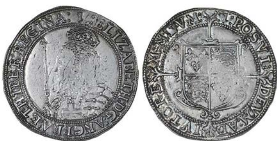
224 Halfcrown, mm. 1, 14.96g/5h (N 2013; S 2583). Some haymarking and a slight trace of double-striking on obverse, otherwise very fine £1,200-1,500