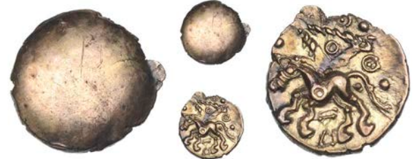
318 Uninscribed issues, Quarter-Stater, Late Weald type, similar, 1.32g (ABC 198; BMC 2469-70; VA 151; S 172). Good very fine £250-300