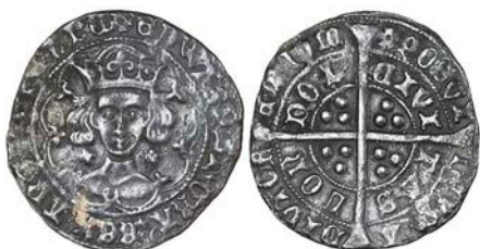
155 Heavy coinage, Groat, class II, mm. rose, crescent on breast, quatrefoils by neck, 3.76g/5h (B & W iv/v; N 1531; S 1972). Fire damaged and blackened, otherwise nearly very fine £150-200