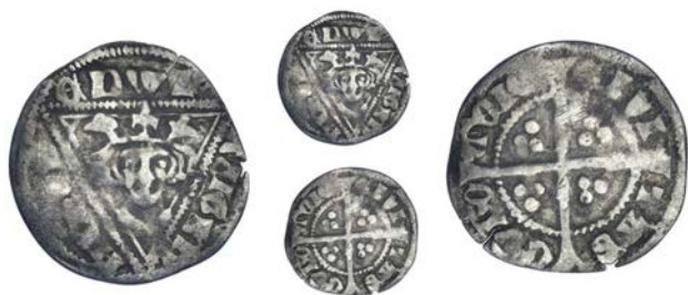
802 Edward I , Second coinage, Halfpenny, Cork, type III, splayed crown, 0.53g/3h (S 6266; DF 69). Good fine, extremely rare £1,500-2,000