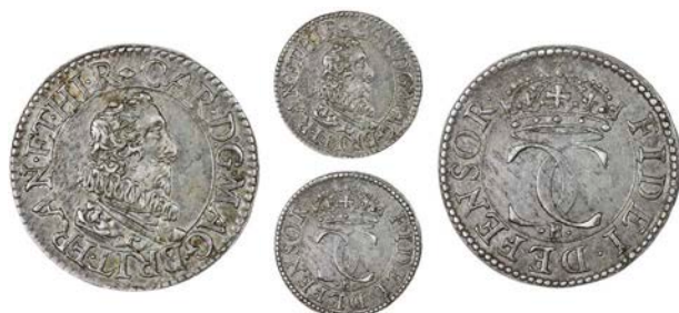
284 Pattern Halfgroat, by N. Briot, in silver, no mm., bare-headed bust in ruff right, rev. crowned interlinked cs, B below, 1.55g/6h (SCBI Brooker 1255, same dies; N 2687; S 2856A). Nearly extremely fine £90-120