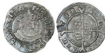
182 Third coinage, Halfgroat, Canterbury, no mm, bust 1 variety, Lombardic lettering, open forks, trefoil stops on obv. only, 1.20g/11h (Whitton b; N 1852; S 2378). About very fine for issue £120-150