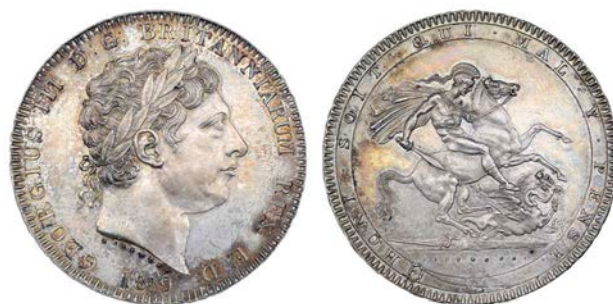
525 Crown, 1819, edge LIX (ESC 215; S 3787). Better than extremely fine, patchy toning £200-300