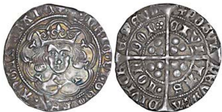
151 Leaf-Trefoil issue, Groat, London, mm. crosses IIIb/V, leaf on breast and after HENRIC, DI and GRA, trefoil after REX, leaf before LON, trefoil after DON, 3.85g/3h (Whitton 25a; N 1484; S 1897). Good very fine, attractively toned £200-250