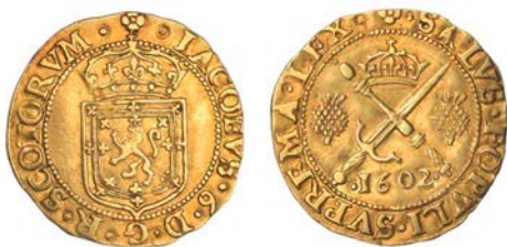
672 Eighth coinage, Sword and Sceptre piece, 1602, mm. quatrefoil, 5.03g/6h (SCBI 35, 1185-90; B 4; S 5460). Scratches to the right of shield, otherwise very fine, reverse better £1,200-1,500 Provenance: Glendining Auction, 3 October 1963, lot 240; bt Spink 1977