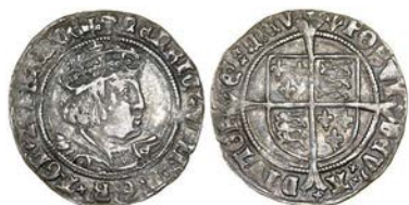
173 Second coinage, Groat, mm. lis on obv. , pheon on rev. , bust D, reads FRANCE, saltires in forks, 2.75g/11h (Whitton ix; N 1797; S 2337E). Legends weak in places, otherwise very fine £150-200