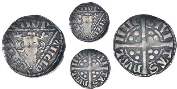
801 Edward I , Second coinage, Penny, Dublin, a contemporary copy in the style of type IV, reads EDVR, 1.14g/3h (cf. S 6246; cf. DF 68). Nearly very fine, rare £200-250