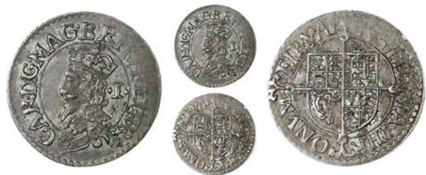
255 Penny, no mm, signed B below bust, 0.52g/9h (SCBI Brooker 722, same dies; N 2303; S 2857). Legends weak in places, otherwise extremely fine £90-120