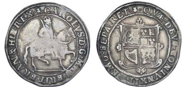
675 First coinage, Thirty Shillings, mm. thistle-head, 14.89g/4h (Murray pl. iii, 13; SCBI 35, 1411-2; B 2, fig. 997; S 5541). Nearly very fine, toned £300-400