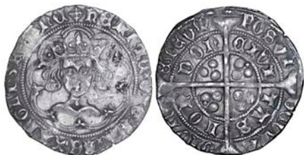
153 Leaf-Pellet issue, Groat, London, mm. cross IIIb on obv. only, leaf on neck, fleur on breast, pellets by crown, extra pellets in two quarters, 3.52g/6h (cf. Whitton 58; N 1505; S 1917). A little peripheral staining, otherwise very fine or better, dark tone £150-200