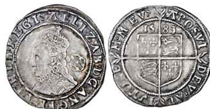
218 Sixpence, 1583, mm. A (over bell on rev. ), bust 5A, 3.09g/9h (N 2015; S 2578A). Nearly very fine, lightly toned £120-150