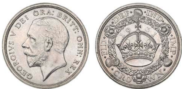
644 Crown, 1931 (ESC 371; S 4036). Good extremely fine £250-300