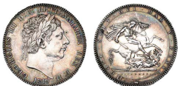
530 Crown, 1819, edge LX (ESC 216; S 3787). Extremely fine or better, lightly cleaned at some time, now toned £120-150