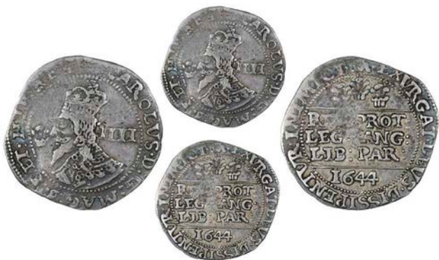
273 Groat, 1644, mm. Br on rev. only, tall narrow bust, large plume in front, three plumes above Declaration, 1.86g/1h (Morr. C-1; SCBI Brooker 1005, same dies; N 2505; S 3023A). Obverse weak, otherwise fine, rare £120-150