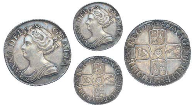
496 Sixpence, 1711, small lis in French arms (ESC 1596; S 3619). Two slight obverse die-cracks, otherwise nearly extremely fine, toned £90-120