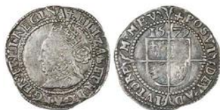
212 Threepence, 1579, mm. Latin cross on obv. , Greek cross on rev. , bust 4D, 1.45g/10h (N 1998; S 2573). Centres weak, otherwise very fine, the mule of marks extremely rare £200-250