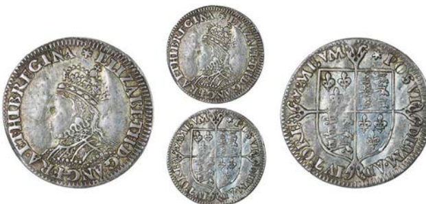
242 Halfgroat, mm. star, 1.06g/6h (Borden/Brown 20, O2/R2; N 2037; S 2606). Slightly creased and the obverse a little dented, otherwise nearly very fine and lightly toned, rare £200-250