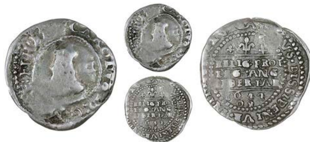
269 Halfgroat, 1644, mm. lis, rev. Declaration, large lis between two small lis above, date and ox below, 0.93g/4h (Morr. A-3; SCBI Brooker 964, same dies; N 2475; S 2997). Obverse fine, reverse very fine but off-centre £80-100