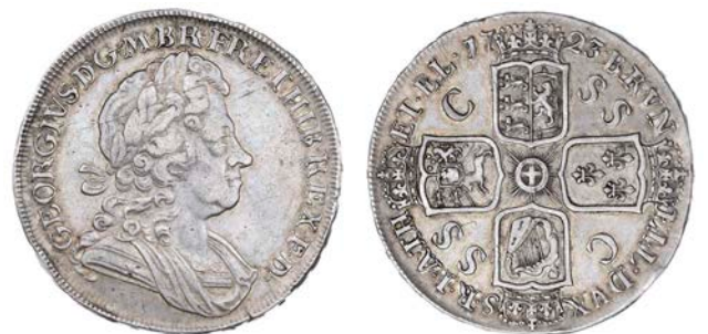
497 Crown, 1723 SSC, edge DECIMO (ESC 114; S 3640). A couple of rim bruises and a light scratch in hair, otherwise very fine, toned £600-800