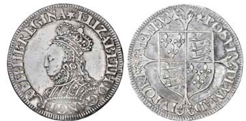
230 Shilling, small size, mm. star, 6.28g/5h (Borden/Brown 17, O1/R1; N 2023; S 2592). Some surface marks, otherwise about very fine, toned £500-700