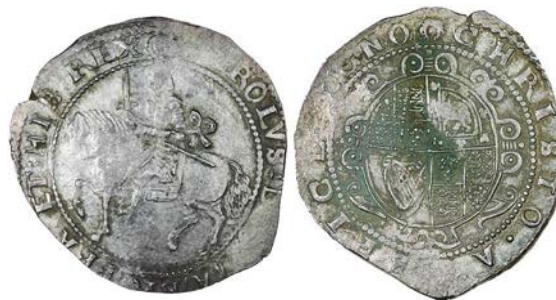
277 Halfcrown, undated, mm. rose, rev. oval scroll garnished shield, 13.28g/2h (Bull 660/16; Besly J16; SCBI Brooker 1027, same obv. die; N 2550/1; S 3065). Weak in places and some verdigris on reverse, otherwise very fine £300-400