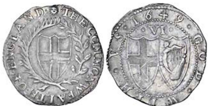
294 Sixpence, 1649, mm. sun on obv. only, 2.92g/3h (ESC 1483; N 2726; S 3219). Several die scores on reverse, otherwise good fine or better, toned £200-250