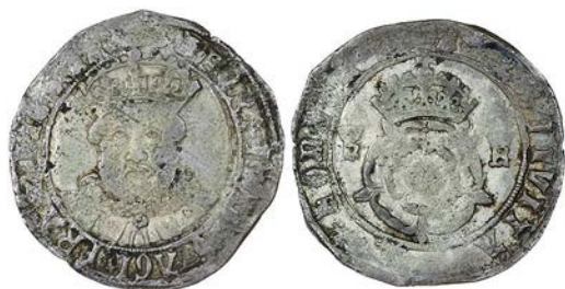
177 Third coinage, Testoon, Southwark, mm. S on obv. , Roman E on rev. , 7.35g/2h (Jacob dies O4/R8; N 1842; S 2367). Better than fine for issue £600-800