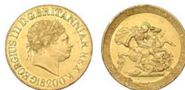
523 Sovereign, 1820, open 2 (M 4; S 3785C). Scuffs on face, other surface and edge marks, otherwise nearly extremely fine £500-600