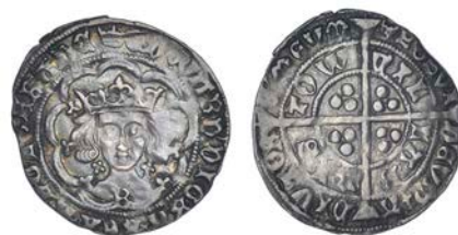
159 Light coinage, Groat, Bristol, class VII, mm. crown, quatrefoils by neck, fleurs on cusps except above crown, B on breast, reads BRISTOW, V of VILLA over C, saltire stops, 2.99g/2h (B & W VIIa; N 1580; S 2004). Nearly very fine £120-150