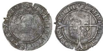
180 Third coinage, Groat, Bristol, mm. WS on rev. only, local bust, Lombardic letters both sides, trefoils in forks, pellet stops, rose after CIVITAS and lis before BRISTOLIE, pellet below shield in third quarter, 2.29g/5h (Whitton 2; N 1846; S 2372). Edge a little ragged and surfaces porous, otherwise fine, reverse better £120-150