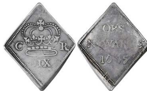
285 Ninepence, 1645, crown with jewelled band, rev. obs NEWARKE, 4.40g/12h (Hird 260-1, same dies; Brooker 1226, same obv. die; N 2641; S 3145). Obverse very fine, reverse fine £500-600