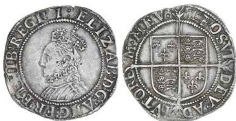
225 Shilling, mm. 1, bust 6B, 5.96g/10h (N 2014; S 2584). About very fine or better £200-250