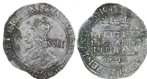
272 Shilling, 1643, mm. plume on obv., Br on rev., from an Oxford obv. die, three Bristol plumes above Declaration, 6.08g/7h (Morr. A-5; SCBI Brooker 992, same dies; N 2494; S 3012). Weak in places and some corrosion, otherwise very fine £300-400