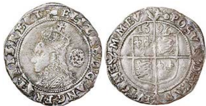
223 Sixpence, 1596, mm. key (over woolpack on obv. ), bust 6C, 2.91g/10h (N 2015; S 2578B). Some faint hairlines on obverse, otherwise fine £80-100