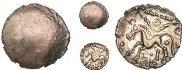
313 Uninscribed issues, Quarter-Stater, Late Weald type, similar, 1.36g (ABC 198; BMC 2469-70; VA 151; S 172). Nearly extremely fine £300-350