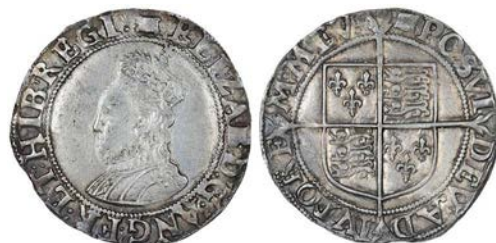
216 Shilling, mm. woolpack, bust 6B, 6.18g/11h (N 2014; S 2577). Very fine, reverse better £200-250