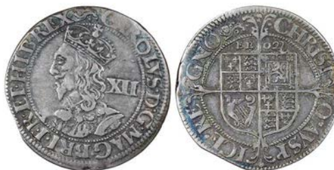
280 Shilling, Gp 1 [type 1], mm. lion, 5.51g/9h (Besly 1A; SCBI Brooker 1089, same dies; N 2316; S 2870). A few scratches above mark of value, otherwise nearly very fine £150-200