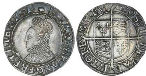
215 Shilling, mm. tun, bust 6B, 6.23g/11h (N 2014; S 2577). About very fine £200-250