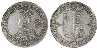
233 Sixpence, 1562, mm. star, bust C, 2.98g/6h (Borden and Brown 24, O2/R3; N 2026; S 2595). Nearly extremely fine £250-300