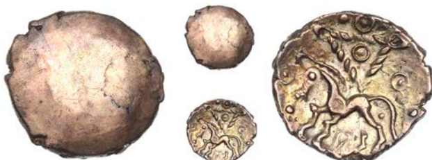
316 Uninscribed issues, Quarter-Stater, Late Weald type, similar, 1.31g (ABC 198; BMC 2469-70; VA 151; S 172). Good very fine £250-300