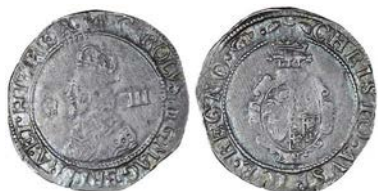
283 Groat, mm. crown, plume before bust, rev. plume above scroll garnished shield, 1.99g/11h (SCBI Brooker 790, same dies; N 2354; S 2911). Weak in places, otherwise nearly very fine, rare £300-350