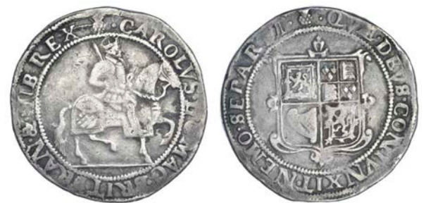
676 First coinage, Thirty Shillings, mm. thistle-head, 14.86g/4h (Murray pl. iii, 13; SCBI 35, 1411-12; B 2, fig. 997; S 5541). Fine or better £150-200