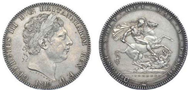
527 Crown, 1819, edge LIX (ESC 215; S 3787). Lightly cleaned at some time and minor surface marks, otherwise good very fine £90-120