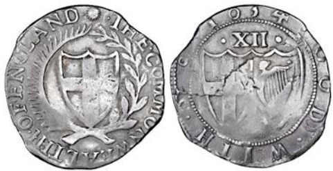
290 Shilling, 1654, mm. sun on obv. only, 5.85g/12h (ESC 990; N 2724; S 3217). The H of COMMONWEALTH double-struck to form two hs ligate, on an irregular flan, good fine, an interesting mis-strike £150-250