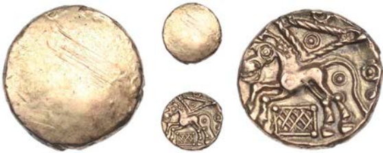
311 Uninscribed issues, Quarter-Stater, Late Weald type, blank, rev. horse left, corded triangle above, lattice-work box below, pellets and annulets around, 1.34g (ABC 198; BMC 2469-70; VA 151; S 172). Nearly extremely fine £300-350