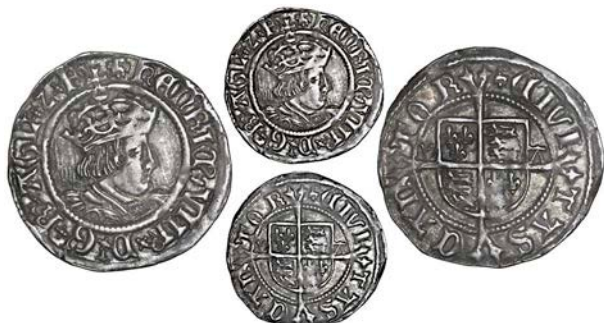
174 Second coinage, Halfgroat, Canterbury, Abp Warham, mm. uncertain mark, wa by shield, 1.37g/5h (Whitton ii; N 1802; S 2343). Good very fine, toned £120-150