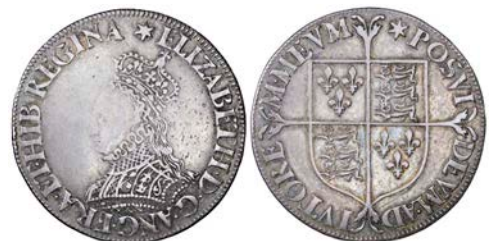
229 Shilling, intermediate size, mm. star, 6.21g/5h (Borden/Brown 16, O2/R2; N 2023; S 2591). A little weak on the face, otherwise nearly very fine, toned £300-400