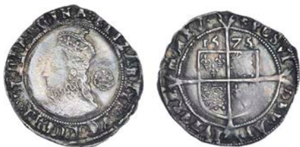
210 Sixpence, 1575/4, mm. eglantine, bust 5A, 3.08g/10h (N 1997; S 2563). Face and part of shield flat, otherwise very fine, the overdate clear £80-100