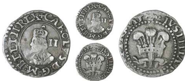
270 Halfgroat, undated, mm. crown on obv., lis on rev., inverted A for V in CAROLVS, rev. large plume, inverted V for A in FIRMAT, 0.89g/3h (Morr. B-1; SCBI Brooker 965, same dies; N 2474; S 2996). Nearly very fine £150-200