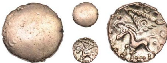
315 Uninscribed issues, Quarter-Stater, Late Weald type, similar, 1.32g (ABC 198; BMC 2469-70; VA 151; S 172). Good very fine £250-300