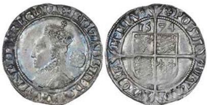
209 Sixpence, 1574, mm. eglantine, bust 5A, 3.22g/12h (N 1997; S 2563). Very fine, attractively toned £150-200