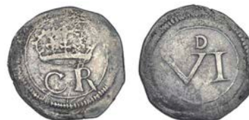
812 Charles I (1625-49), Ormonde Money, Sixpence, 2.63g/3h (S 6547; DF 302). Nearly very fine £250-300