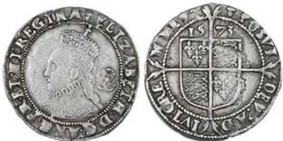
208 Sixpence, 1573, mm. acorn, bust 5A, 3.06g/7h (N 1997; S 2563). Nearly very fine £90-120