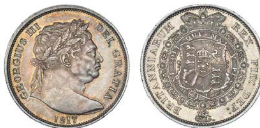
533 Halfcrown, 1817, large head (ESC 616; S 3788). Extremely fine or better, toned £250-300