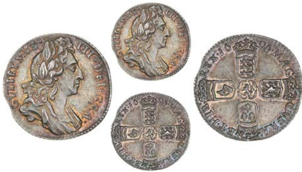
490 Sixpence, 1696, first bust, large crowns, early harp (ESC 1533; S 3520). Small edge flaw, otherwise extremely fine, attractively toned £90-120