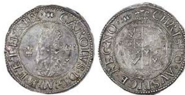
261 Groat, mm. book, small bust, rev. plume without bands, 2.01g/11h (Morr. A-1; SCBI Brooker 764, same dies; N 2338; S 2892). Obverse from a cracked die, good very fine £120-150