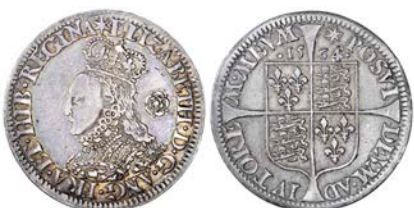
236 Sixpence, 1564/2, mm. star, bust D, 2.97g/8h (Borden/Brown 34, O2/R2; N 2028; S 2597). A few surface marks, otherwise nearly very fine, attractively toned £200-250

In an early die state, where the flaw at FRA is no more than a small swelling between R and A