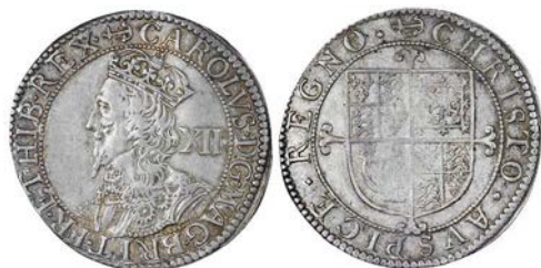
256 Shilling, mm. anchor, signed B both sides, 5.84g/6h (SCBI Brooker 725-6, same dies; N 2305; S 2859). Very fine £300-400