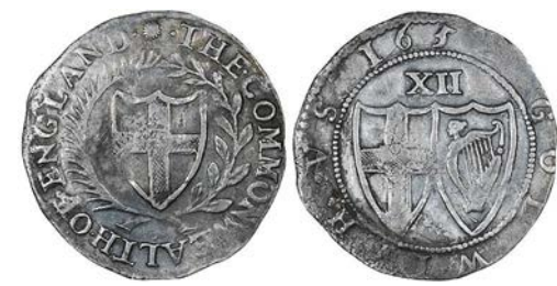
288 Shilling, 1652, mm. sun on obv. only, no stops on rev. , 5.70g/6h (ESC 985B; N 2724; S 3217). Some corrosion, otherwise nearly very fine, rare £150-200