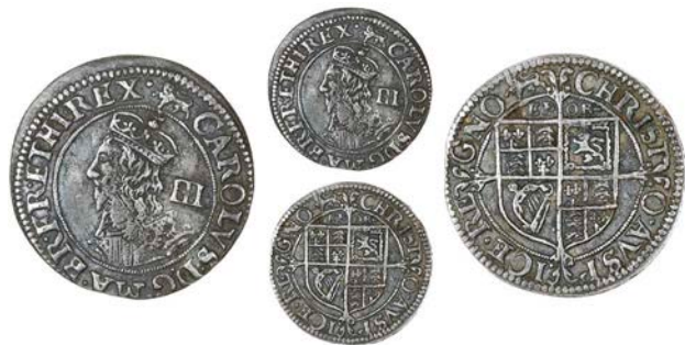
282 Threepence, mm. lion, reads MA, 1.22g/9h (Besly 1C; SCBI Brooker 1104, same dies; N 2323; S 2877). Coarse surfaces and scratched before bust, otherwise good very fine £80-100