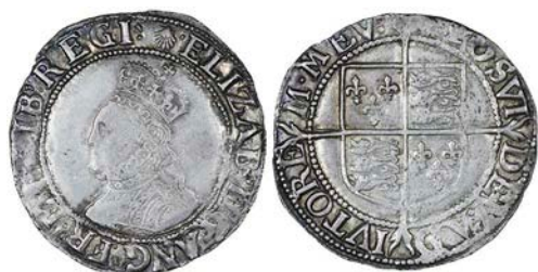
213 Shilling, mm. escallop, bust 6A, 6.08g/3h (N 2014; S 2577). Portrait a little weak in places, otherwise better than very fine £250-300