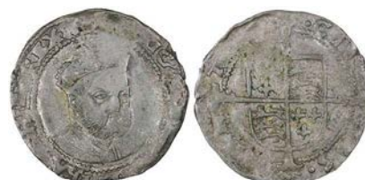
184 Posthumous coinage, Groat, Canterbury, no mm, bust 6, Roman lettering, roses in forks, round pellet stops, 2.46g/1h (Whitton e; N 1875; S 2408). Flat in places, otherwise nearly very fine for issue £120-150