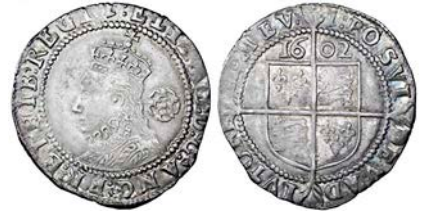
227 Sixpence, 1602, mm. 1, bust 6C, 3.07g/12h (N 2015; S 2585). Very fine or better, attractively toned £150-200