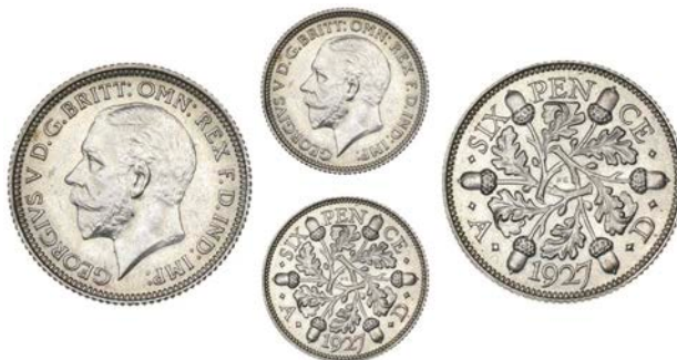
654 Matt Proof Sixpence, 1927, 2.84g/12h (Davies 1891M; ESC 1816A; S 4040). Mark in front of face, otherwise virtually as struck, extremely rare £200-300 Slabbed in NGC holder, graded PF 65