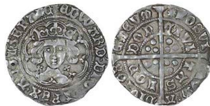
158 Light coinage, Groat, London, class VI, mm. sun, quatrefoils by neck, fleur on breast, 3.05g/3h (B & W VI, 1; N 1569; S 2000). Very fine £120-150