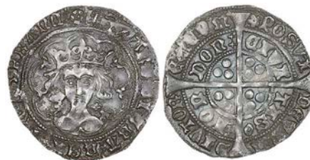
156 Heavy coinage, Groat, class III, mm. rose, quatrefoils by neck, trefoil on breast, eye after TAS, 3.58g/11h (B & W vii/d; N 1532; S 1974). Surfaces somewhat pitted, otherwise nearly very fine £180-220