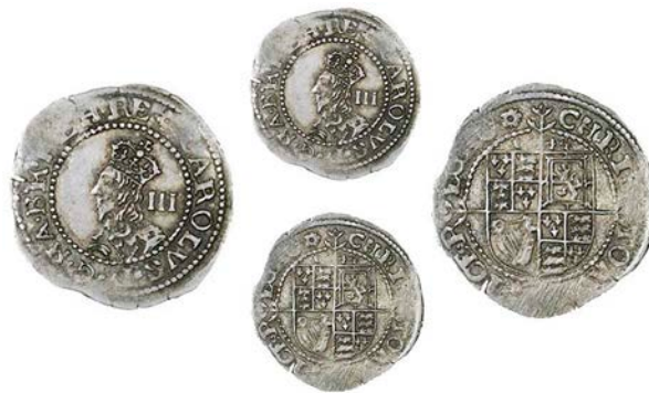
279 Threepence, 1644, mm. rose, rev. square topped shield over cross fleury, date above, 1.27g/8h (Besly 1A; SCBI Brooker 1072, same dies; N 2580; S 3089). Striking crack at 9 o'clock and legends flat in places, otherwise very fine £200-250