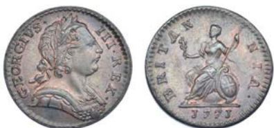
515 Farthing, 1771, rev. C, olive branch to right limb of A of BRITANNIA, first 7 of date over 1 (Cooke 368; BMC 909; S 3775). Extremely fine with a hint of original colour, rare £250-350