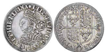
231 Sixpence, 1561, mm. star, bust A, 2.92g/6h (Borden/Brown 21, O2/R2; N 2024; S 2593). About very fine, toned £200-250