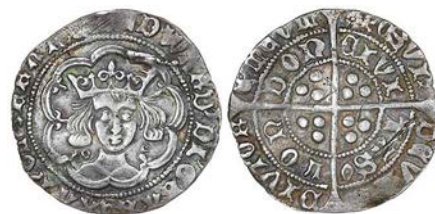
157 Heavy coinage, Groat, class IV, mm. rose, annulets by neck, no fleur on breast, reads FRANC (?), contraction stops, eye after TAS, 3.74g/7h (B & W IV-/i; N 1533; S 1977). Slightly creased and split above crown, otherwise nearly very fine £200-250