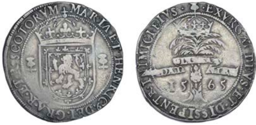
667 Fourth period, One-Third Ryal, 1565, mm. thistle on rev. only, 9.95g/10h (SCBI 35, 1129-30; SCBI 58, 1215-16; B 17, fig. 910; S 5427). Nearly very fine £600-800 Provenance: Bt Spink 1978