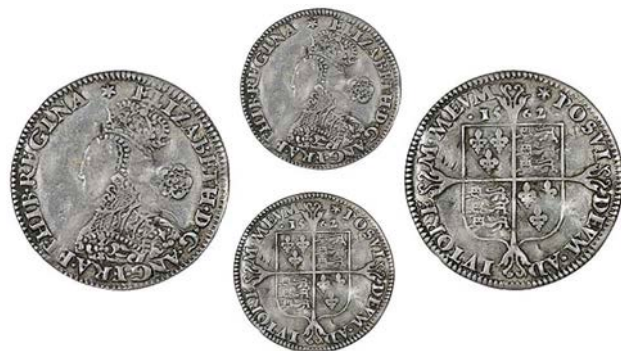
241 Threepence, 1562, mm. star, bust C, 1.55g/6h (Borden/Brown 45, O2/R2; N 2034; S 2603). Created and crimped, otherwise about very fine £150-200