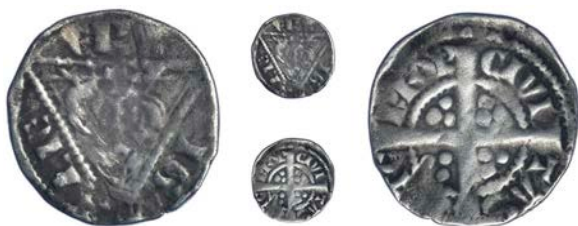
804 Edward I , Second coinage, Farthing, Waterford, type I, 0.32g/12h (S 6268; DF 70). Better than fine £90-120