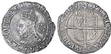
221 Sixpence, 1593, mm. tun, bust 6C, 2.47g/11h (N 2015; S 2578B). Some light obverse surface marks, otherwise about very fine, reverse better £150-200