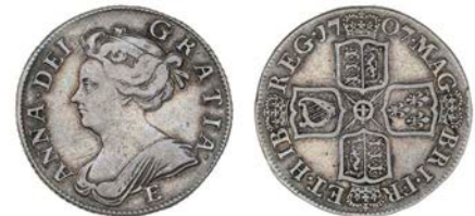
495 Shilling, 1707 E , second bust (ESC 1138; S 3608). Good fine or better £120-150