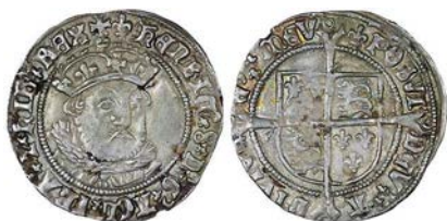
178 Third coinage, Groat, Tower, mm. lis, bust 1, Lombardic lettering, annulets in forks, saltire stops, 2.39g/8h (Whitton A2; N 1844; S 2369). A few small verdigris spots, otherwise about very fine £200-300