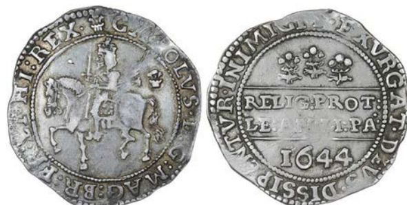
271 Halfcrown, 1644, mm. plume on obv., Br on rev., plume behind horseman, three plumes above Declaration, 14.29g/3h (Bull 640; Morr. B-1; SCBI Brooker 981, same dies; N 2489; S 3007). Weak in places, otherwise nearly very fine £300-350