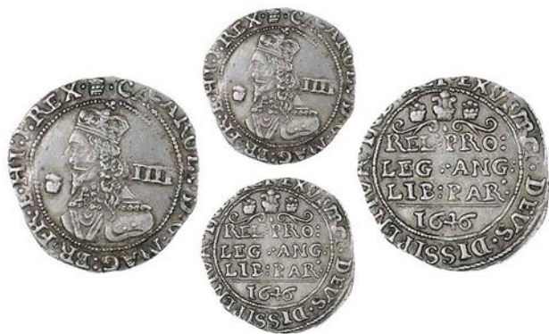
276 Groat, 1646, Bridgnorth-on-Severn (?), mm. plumelet on obv. only, plumelet before bust, reads HI, rev. Declaration surmounted by scrolls with tall plume between two plumelets, date below, 1.79g/12h (Morr. A-1; cf. SCBI Brooker 1133; N 2525; S 3042). Profile double-struck, otherwise very fine £300-350