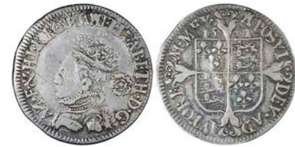
239 Sixpence, 1571/0, mm. castle (over lis both sides), bust G, 2.96g/6h (Borden/Brown 43; N 2031; S 2600). Scratch in obverse field, otherwise fine, very rare £200-250