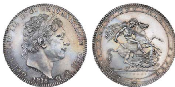
524 Crown, 1818, edge LIX (ESC 214; S 3787). Some light hairlining, otherwise good extremely fine with proof-like fields £200-300