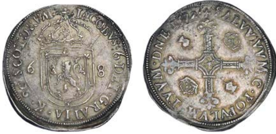
668 Second coinage, Half-Merk, 1572, mm. cross on rev. only, thistle in first and fourth quarters, crown in second and third, 6.96g/2h (SCBI 35, 1218-19; SCBI 58, 1379-87; B 1, fig. 924; S 5478). Better than very fine, on a large flan, toned £200-300 Provenance: Bt Spink 1978