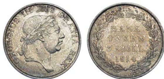
520 Three Shillings, 1814 (ESC 422; S 3770). Tiny mark on neck, otherwise good extremely fine, lightly toned £150-200