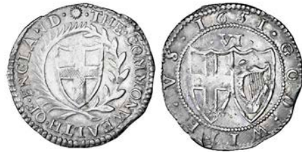
295 Sixpence, 1651, mm. sun on obv. only, 2.90g/4h (ESC 1484; N 2726; S 3219). Good very fine, toned £400-500