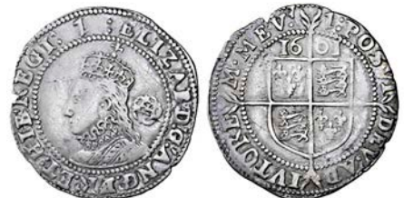
226 Sixpence, 1601, mm. 1, bust 6C, 2.86g/4h (N 2015; S 2585). Nearly very fine, toned £120-150