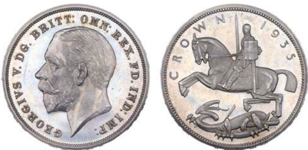
648 Proof Crown, 1935, edge xxv, 28.29g/12h (ESC 378; S 4050). Practically as struck £350-450