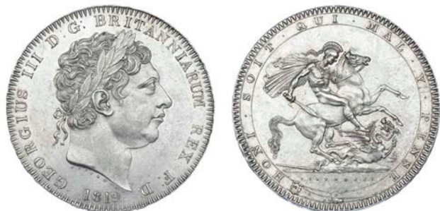
528 Crown, 1819, edge LIX (ESC 215; S 3787). Scuffed and cleaned at some time, minor surface marks, otherwise good very fine £90-120