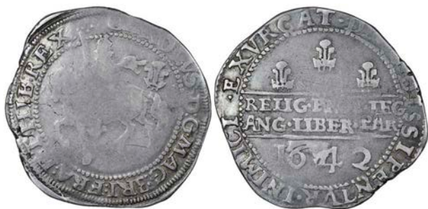
265 Halfcrown, 1642, Aberystwyth horseman, Aberystwyth plume in field behind, three Shrewsbury plumes above Declaration, 14.56g/9h (Bull 584/4e; Morr. B-4; SCBI Brooker 812A, same dies; N 2327; S 2928). Horseman flat, otherwise fine, rare £300-350