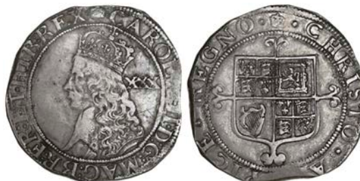
301 Third issue, Halfcrown, mm. crown, 15.18g/4h (ESC 456; N 2761; S 3321). Scratch behind head, otherwise nearly very fine, reverse better £400-600