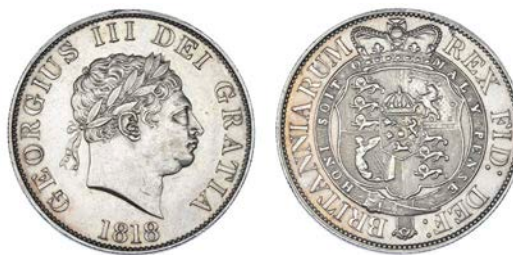
536 Halfcrown, 1818, small head (ESC 621; S 3789). Some surface marks, otherwise extremely fine £150-200