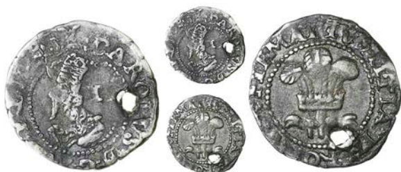
274 Penny, undated, no mm., rev. plume, pellet before legends, 0.54g/3h (Morr. A-1; SCBI Brooker –; N 2511; S 3027). Pierced at 3 o'clock, otherwise nearly very fine, extremely rare £200-250