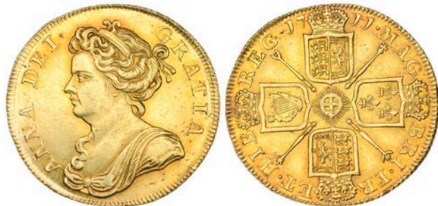
491 Two Guineas, 1711 (MCE 206; S 3569). Some light hairlining, otherwise good extremely fine, reverse retaining some mint bloom £5,000-6,000 Provenance: Bt Spink