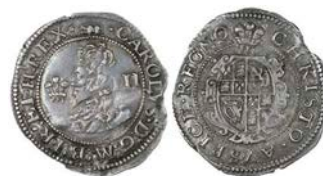
262 Threepence, mm. book, rev. plume without bands, 1.45g/4h (Morr. A-2; SCBI Brooker 775, same dies; N 2340; S 2894). Very fine £80-100