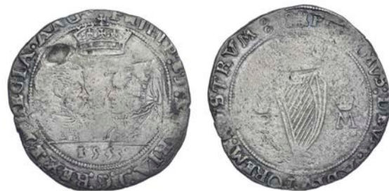
807 Philip and Mary , Shilling, 1555, mm. portcullis on rev. only, reads ANG, 8.65g/7h (S 6500; DF 232). Flan flaw above Philip's head, otherwise fine or better for issue £200-250