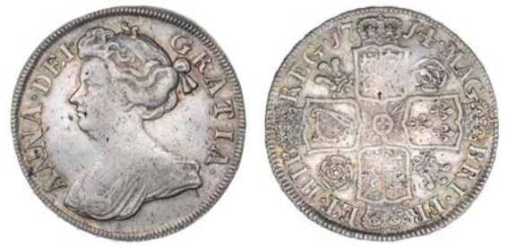
494 Halfcrown, 1714, roses and plumes, edge DECIMO TERTIO (ESC 585; S 3607). A little haymarked and weak in places, otherwise good very fine £250-300