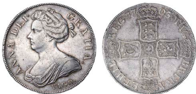
492 Crown, 1703 VIGO, edge TERTIO (ESC 99; S 3576). A few surface marks, otherwise good very fine £1,200-1,500