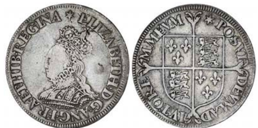
228 Shilling, large size, mm. star, rev. corner of shield points to centre of E of MEVM, 6.08g/6h (Borden/Brown 15, O1/R -; N 2023; S 2590). Obverse fine, reverse better, the reverse die not recorded by Borden and Brown, very rare £400-500