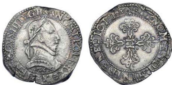
1146 Franc au col plat, 1584 κ , Bordeaux, date below bust, 13.88g/1h (Duplessy 1130). Slightly double-struck, otherwise very fine or better £100-150

Provenance: CNG Auction 29, 30 March 1994, lot 1389