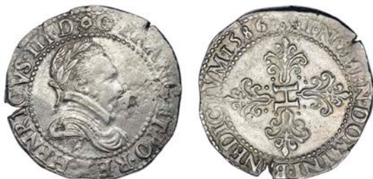
1147 Franc au col plat, 1586 b , Rouen, 13.87g/9h (Duplessy 1130). Nearly very fine £100-150