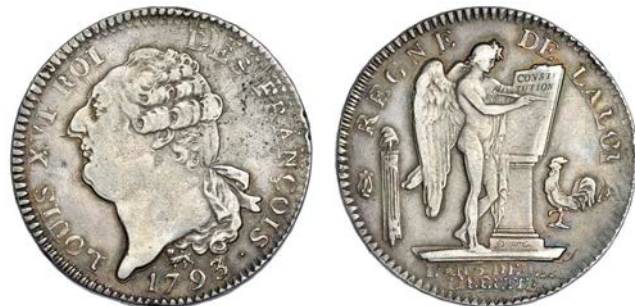
1308 Constitution , Écu de 6 Livres, 1793A, Paris (VG 55; KM. 615.1). Slightly double-struck, otherwise better than very fine