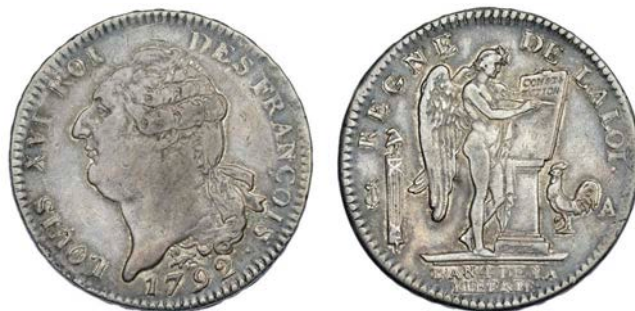
1307 Constitution , Écu de 6 Livres, 1792A, Paris (VG 55; KM. 615.1). Nearly very fine