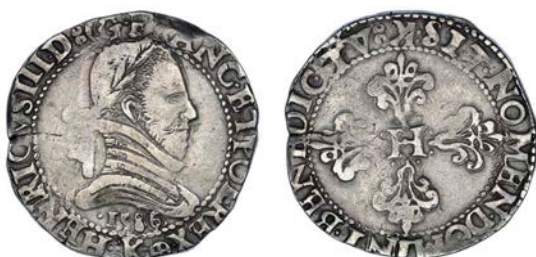
1149 Franc au col plat, 1586 κ , Bordeaux, date below bust, 13.93g/6h (Duplessy 1130). Nearly very fine £90-120