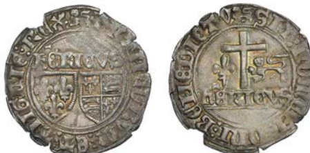
1058 Grand Blanc aux écus, Rouen, mm. leopard, 2.92g/6h (E 287). Small edge chip, otherwise about very fine, toned £90-120