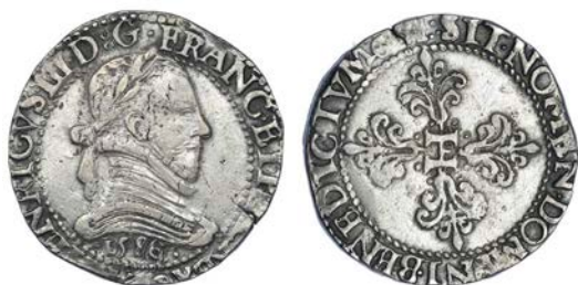
1148 Franc au col plat, 1586 κ , Bordeaux, date below bust, 13.85g/8h (Duplessy 1130). Nearly very fine £100-150