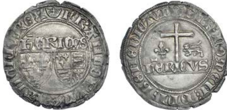
1053 Grand Blanc aux écus, Paris, mm. crown, 3.09g/7h (E 279). On a large flan, better than very fine £150-200