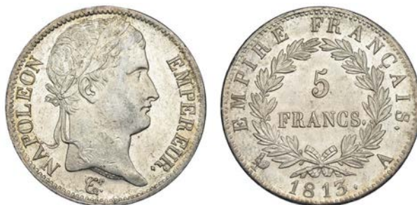
1313 EMPIRE, Napoleon , 5 Francs, 1813A, Paris (VG 584; KM. 694.1). Virtually as struck