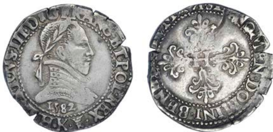
1143 Franc au col plat, 1582 b crowned, Rouen, date below bust, 14.06g/7h (Duplessy 1130). Reverse a little off-centre, otherwise very fine £100-150