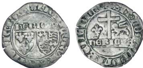
1065 Grand Blanc aux écus, Troyes, mm. rose, 2.86g/6h (E 290). Fine or better, rare