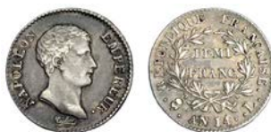
1316 EMPIRE, Napoleon , Demi-Franc, AN 14L, Bayonne [1806] (VG 395; KM. 655.8). Good very fine, rare