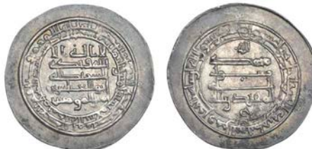
1906 al-Muqtadir , Donative Dirham, Madinat al-Salam 305h, with the name of the heir Abu'l-'Abbas, 3.06g/11h (Ilisch –; A 246A). About extremely fine, rare £600-800