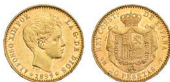
1797 Alfonso XIII , 20 Pesetas, 1899 SM-V (KM. 709; F 348). Nearly extremely fine £200-250