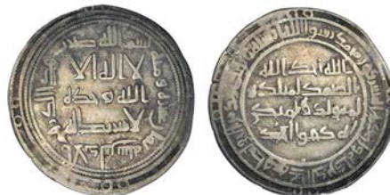
1898 temp. Hisham , Dirham, al-Andalus 118h, 2.70g/7h (Klat 131). Good fine, scarce £200-250