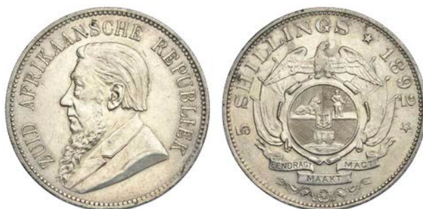
1795 Paul Kruger , Crown, 1892, single shaft (Hern Z37; KM. 8.1). Nearly extremely fine £300-400