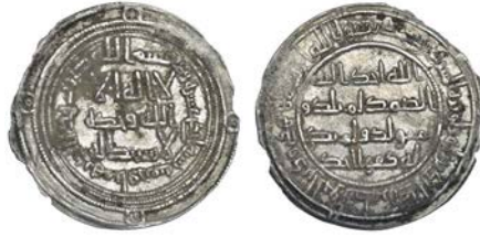
1895 temp. Hisham (105-125h), Dirham, Ifriqiya 111h, 2.87g/1h (Klat 98.b). Edge slightly chipped and minor deposit, otherwise good very fine, scarce £200-250