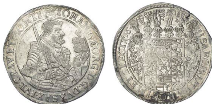
1733 SAXONY, Johan Georg , Thaler, 1631 HI , 28.96g/12h (Dav. 7601; KM. 132). Stained at 12 o'clock and possibly removed from a solder mount, otherwise good very fine, some original brilliance £200-250