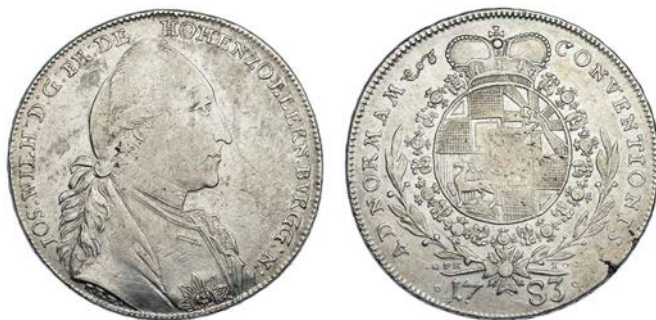
1721 HOHENZOLLERN-HECHINGEN, Josef Wilhelm , Thaler, 1783 ARW-DFH-ICH (KM. 30; Dav. 2362). Sometime cleaned, otherwise better than very fine £250-300