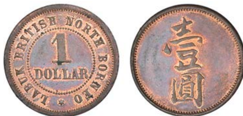
1700 Estates series, Labuk , Dollar (Prid. 39; L & W 664). Extremely fine with considerable original colour