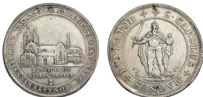
1725 MUNSTER, Sede Vacante , Thaler, 1761 (KM. 199; Dav. 2470). Scratched in reverse field, otherwise very fine or better £200-250