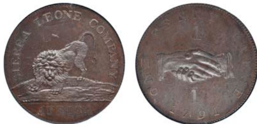
1794 Macaulay & Babington , Restrike Proof Penny, 1791, in bronzed-copper, blades of grass below s of SIERRA, edge plain, 31mm, 6h (Vice FT 5; KM. 2.2). Metal flaw by wrist of right hand and other light marks, otherwise virtually as struck £120-150

Slabbed in NGC holder [this somewhat scratched], graded PF63 BN