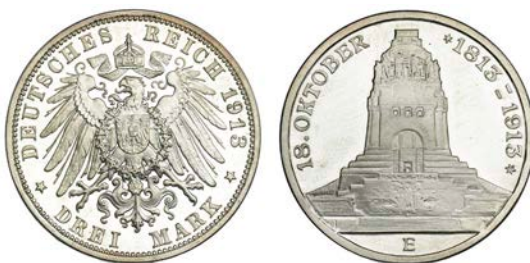
1734 SAXONY, Friedrich August III , Proof 3 Marks, 1913 E (KM. 1275). Brilliant, virtually as struck £100-150