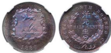
1699 British North Borneo Co, Specimen Half-Cent, 1886H (Prid. 30; KM. 1). Brilliant mint state Slabbed in NGC holder, graded SP65 RB