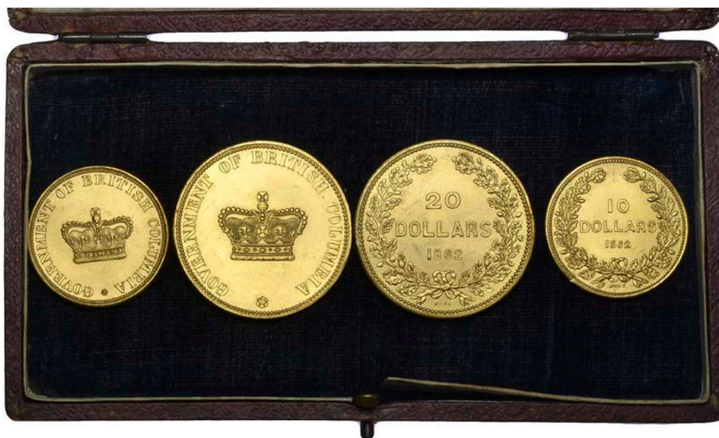
1701 BRITISH COLUMBIA, uniface electrotype copies of the obverses and reverses of the Pattern 20 and 10 Dollars, 1862, by A. Kuner, 40 and 32mm (KM. Pn 2, 4; cf. F 1, 2; cf. Belzberg 15804-7) [4]. Extremely fine; in a contemporary leather case