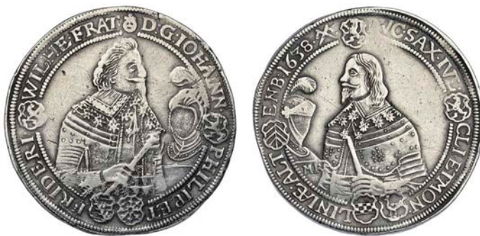
1726 SAXE-ALTENBERG, Johann Philip and Friedrich Wilhelm , Thaler, 1638, 27.61g/9h (KM. 347; Dv. 7381). Sometime cleaned, otherwise very fine or better £300-350