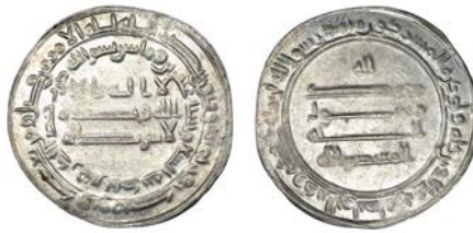
1903 al-Mu'tasim (218-227h), Dirham, Madinat al-Salam 220h, 2.95g/12h (SCC 1235; A 226). About extremely fine £90-120