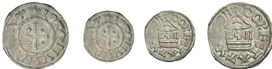
1773 DORESTADT, Lothar I , Denier au temple, 1.70g/6h (MG 525; MEC 819). A little weak in places, otherwise very fine, rare £200-300