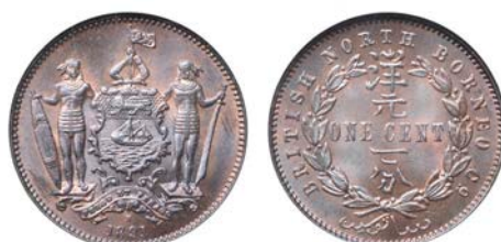
1698 British North Borneo Co , Cent and Half-Cent, both 1891 H (Prid. 20, 32 variety b; KM. 1, 2) [2]. Virtually as struck, first with original colour, second with red-brown patina