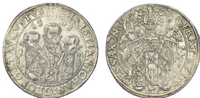
1729 SAXONY, Christian II, Johann Georg and August , Thaler, 1598 HB , Dresden, 29.02g/11h (Dav. 9820; KM. 314). Good very fine £200-250