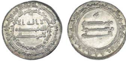
1902 temp. al-Ma'mun , Dirham, Madinat al-Salam 218h, 2.95g/12h (SCC 1225; A 223.6). About extremely fine, scarce £90-120