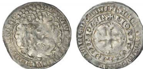
1775 GELDERLAND, Eduard (1361-71), Double-Groot, Arnhem, 3.54g/1h (van der Chijs V:2). Some weakness, otherwise very fine £120-150