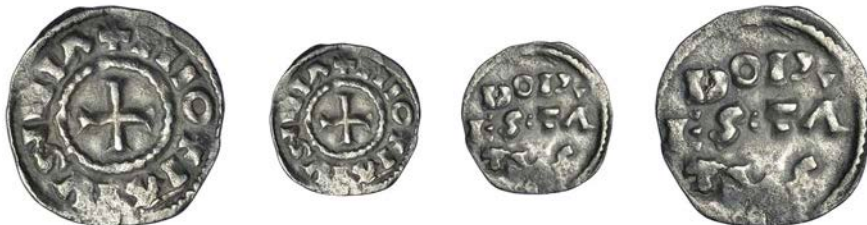
1772 DORESTADT, Lothar I (840-855), Denier, 1.40g/12h (MG 524; MEC 820). Nearly very fine £200-300