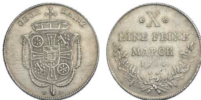
1723 MAINZ, Friedrich Karl Josef , Thaler, 1794FS-1A (KM. 400; Dav. 2432A). Very fine £200-250