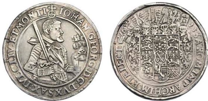
1731 SAXONY, Johan Georg , Thaler, 1623, mm. swan, 28.96g/12h (Dav. 7601; KM. 132). Good very fine £150-200