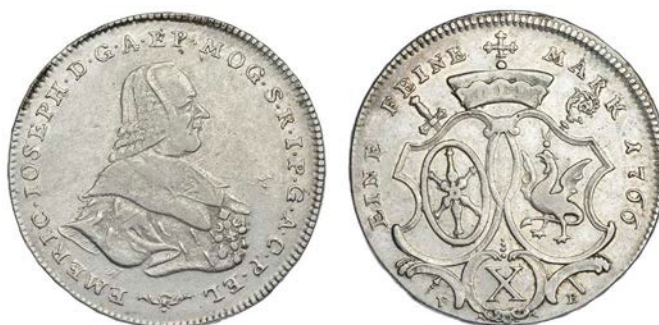
1722 MAINZ, Emeric Josef , Thaler, 1766A-FB (KM. 361; Dav. 2425). Sometime cleaned, otherwise better than very fine £150-200