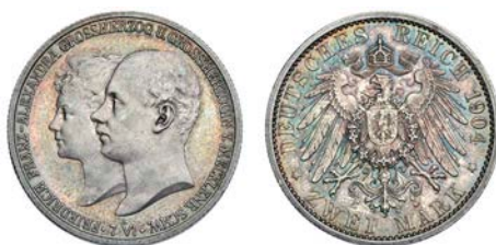
1724 MECKLENBURG-SCHWERIN, Friedrich Franz IV , Proof 2 Marks, 1904A, Wedding of the Duke and Duchess (KM. 333). Good extremely fine, toned £150-200