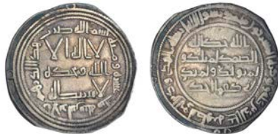
1897 temp. Hisham , Dirham, al-Andalus 116h, 2.61g/6h (Klat 129). Slightly clipped, otherwise good fine, scarce £150-200