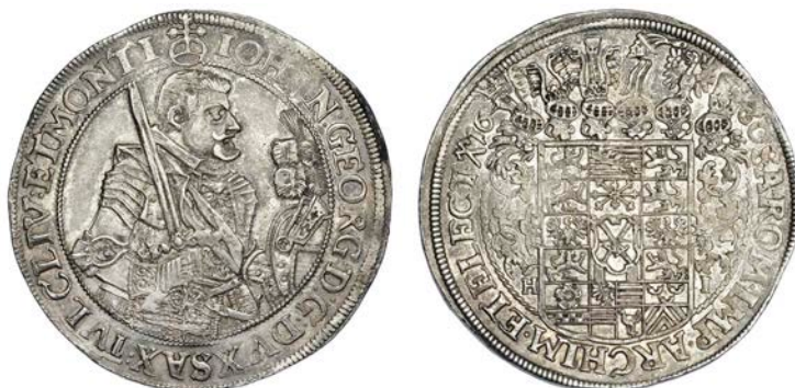
1732 SAXONY, Johan Georg , Thaler, 1630 HI , 29.03g/9h (KM. 132; Dav. 7601). Good very fine £200-250