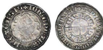
1777 UTRECHT, Jan van Arkel (1342-64), Groot, Utrecht, 2.47g/4h (van der Chijs IX:1). Face weak, otherwise very fine, scarce £120-150