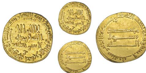
1900 temp. al-Mahdi (158-169h), Dinar, 163h, 4.13g/3h (Lowick 290; A 214). Light graffiti in reverse field, otherwise about extremely fine £200-250