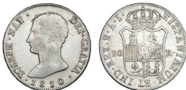
1796 José Napoléon , 20 Réales, 1810AI, Madrid (Cayón 14706; KM. 551.2). Nearly very fine £90-120