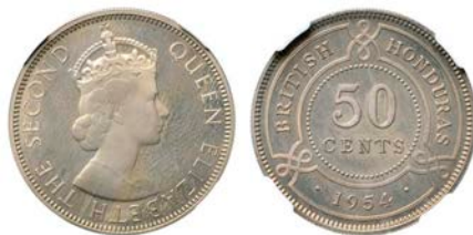
1692 Elizabeth II , Proof 50 Cents, 1954, edge grained, 12h (KM. 28). Brilliant Slabbed in NGC holder, graded PF 65