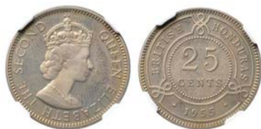
1693 Elizabeth II , Proof 25 Cents, 1955, edge grained, 12h (KM. 29). Light traces of handling on obverse, otherwise brilliant