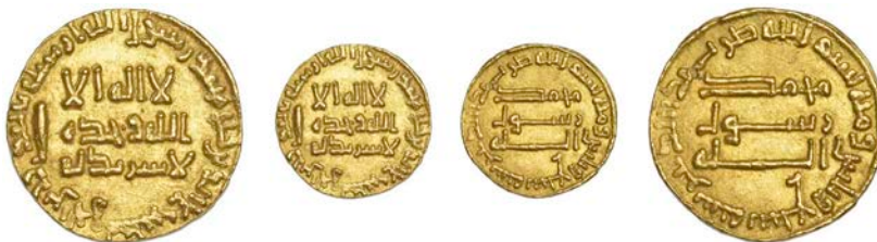
1899 temp. al-Mansur (136-158h), Dinar, 137h, 4.27g/9h (Lowick 187). Extremely fine, rare £300-400