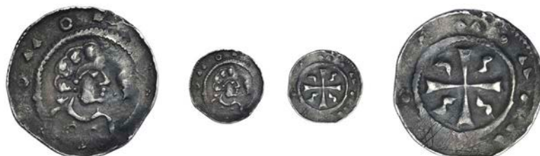
1776 HOLLAND, Willem I (1203-22), Denar, 0.68g/10h (v.d. Chijs 34,5). Very fine, rare £150-200