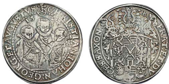
1728 SAXONY, Christian II, Johann Georg and August , Thaler, 1594 HB , Dresden, 29.08g/7h (Dav. 9820; KM. 314). Almost very fine £90-120