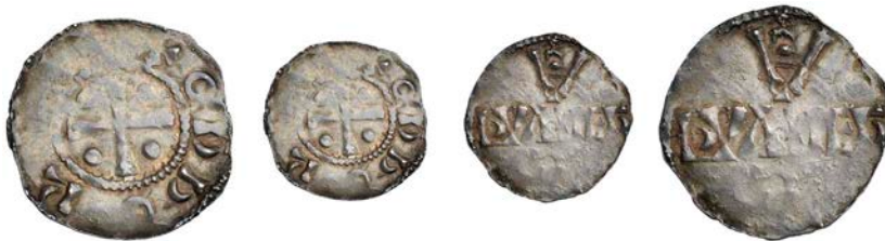
1771 DEVENTER, Otto III (983-1002), Denier, rev. DAVNER (retrograde), 1.13g/8h (Dannenberg 1158). Flat in parts, otherwise very fine, rare £200-250