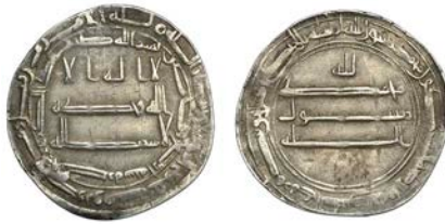
1901 temp. al-Ma'mun (194-218h), Dirham, al-Basra 204h, 2.83g/4h (Lowick 1075; A 223.5). Very fine and very rare £120-150