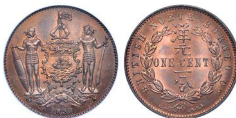
1697 British North Borneo Co , Specimen Cent, 1890 H (Prid. 19; KM. 2). Brilliant mint state