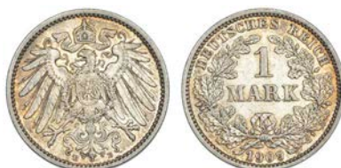
1735 EMPIRE , One Mark, 1909 E (KM. 14). Extremely fine with mint bloom, scarce £90-120