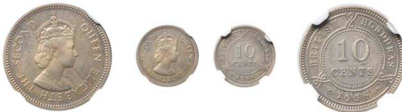
1694 Elizabeth II , Proof 10 Cents, 1956, edge grained, 12h (KM. 32). Brilliant, rare