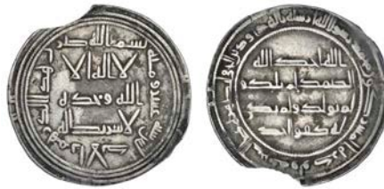
1896 temp. Hisham , Dirham, al-Andalus 110h, 2.80g/6h (Klat 123). Edge chip, otherwise about very fine, scarce £150-200