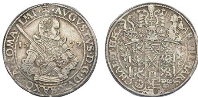
1727 SAXONY, August , Thaler, 1572 HB , Dresden, 28.70g/12h (Dav. 9798; KM. 208). Better than very fine, attractive £200-250