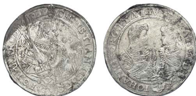
1730 SAXONY, Christian II, Johann Georg and August , Thaler, 1609 HR , Chemnitz, 29.18g/10h (Dav. 7566; KM. 24). Adjustment marks on obverse, some staining, otherwise very fine, possibly sea-salvage £90-120