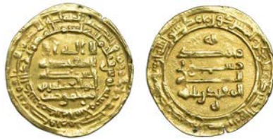
1905 al-Muqtadir (295-320h), Dinar, Madinat al-Salam 305h, with the name of the heir Abu'l-'Abbas, 4.54g/5h (BMC IX: 419g; A 245.2). Small edge split, otherwise very fine, scarce £250-300