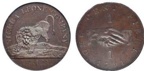
1793 Sierra Leone Co , Proof Cent, 1791, in bronzed-copper, edge plain, 6h (Vice 9A; KM. 1). Virtually as struck £120-150