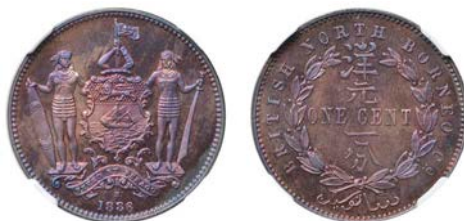
1696 British North Borneo Co , Specimen Cent, 1886 H (Prid. 15; KM. 2). Brilliant mint state

Slabbed in NGC holders, graded MS 64 and MS 67 respectively