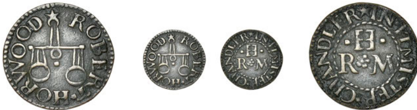
34 Iminster , William Crosse, Farthings (3), 1658, 1.36g/6h (N 4064; BW. 167), undated (2), mm. rosette both sides, 0.70g/6h (N 4065; BW. 166), mm. mullet/rosette, 0.75g/12h (N 4065 rev., different obv.; BW. 166); Robert Horwood, Farthings (2), reads in ITMISTER, 1.04g/6h (N 4066; BW. 169), reads ILMISTER, 1.32g/6h (dies not in N; BW. 168); T.P. and T.S., Farthing, 2.38g/12h (N 4068; BW. 164); Alice Raw, Farthing, 1664, A over o in surname, 0.90g/3h (N 4070; BW. 170) [7]. N 4066 very fine, N 4070 fair, others about fine and better, many very rare £200-250

Provenance: *BW. 162 bt S.E. Schwer April 1986; BW. 163 bt Baldwin April 1987; N 4060 bt Seaby October 1976; N 4061 bt Baldwin June 1988