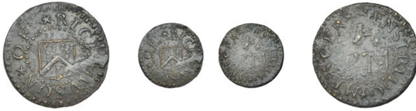
32 Henstridge , Rich Huson, Farthing, 0.87g/9h (N 4058; BW. 157). Die flaws both sides, otherwise about fine, rare; the only issue for the village £60-80