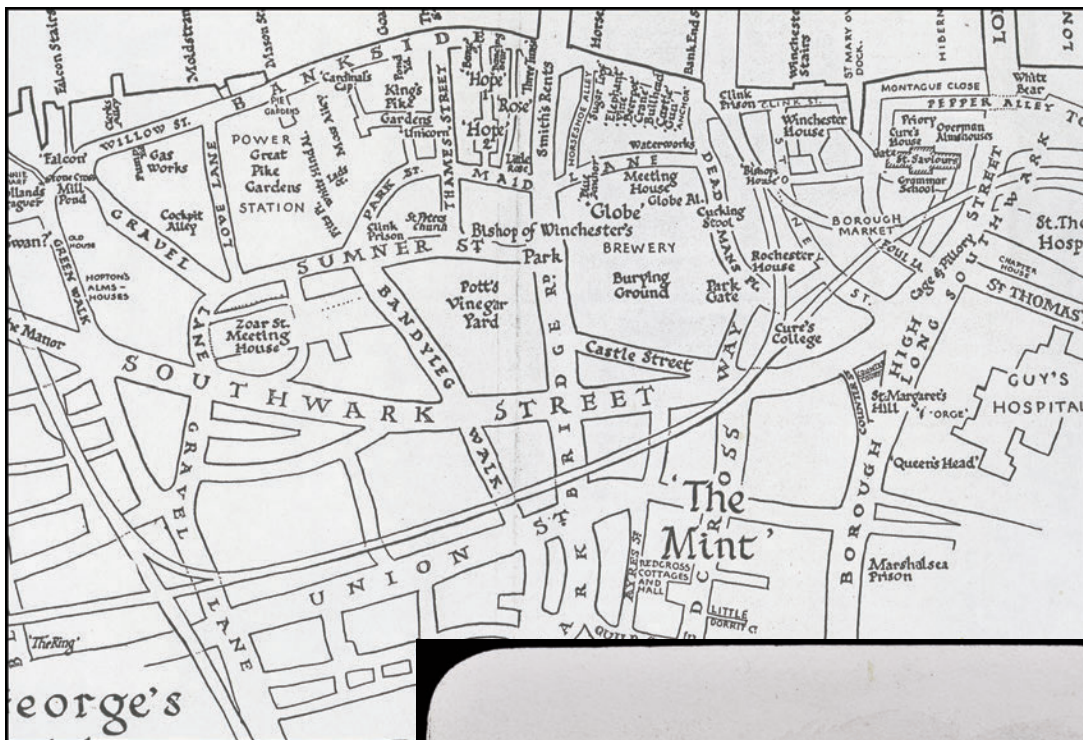
Above: a plan of Southwark. Right: King's Bench Prison.