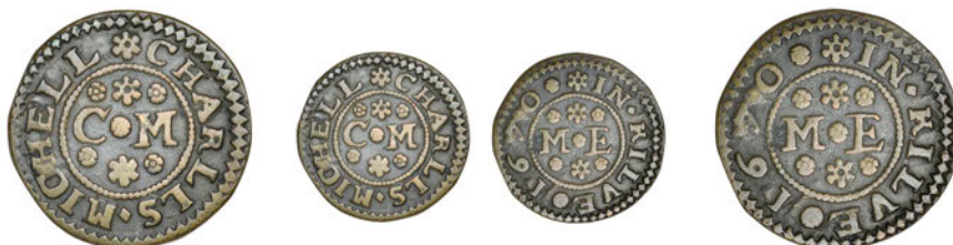
36 Kilve , Charlls Michell, Farthing, 1670, 1.88g/6h (N 4072; BW. 174). Good fine, rare; the only issue for the village £60-80

Provenance: *N 4071 bt Spink November 1978; N 9476 The Property of a Lady, Spink Auction 51, 16 April 1986, lot 196 (part), bt S. E. Schwer April 1986