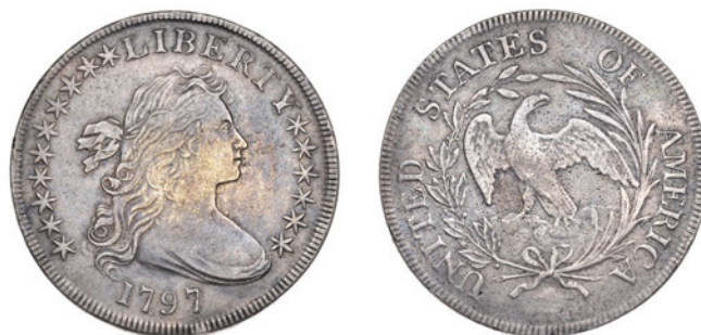
645 Dollar, 1797. Small edge knock at 5 o'clock and some surface porosity on reverse, otherwise better than very fine £1,400-1,800