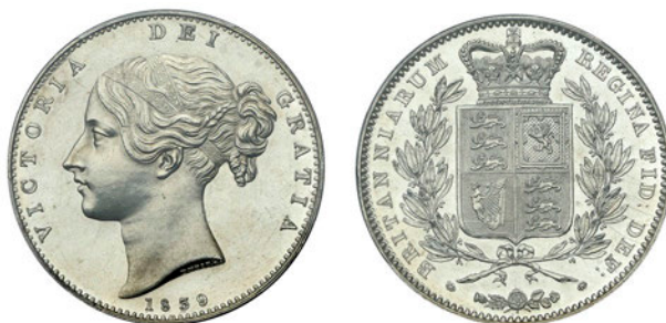
574 Proof Crown, 1839, edge plain, 6h (ESC 2560; S 3882). Of bright appearance, some hairlining, particularly on obverse, otherwise good extremely fine £5,000-6,000 Slabbed in PCGS holder, graded PR 61 CAM