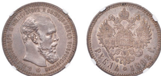
626 Alexander III , Rouble, 1892 AR (KM. Y46). Light wear on the highest points and an edge bruise at 2 o'clock, otherwise good extremely fine, toned £100-150 Slabbed in NGC holder, graded AU 55