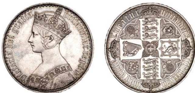
575 'Gothic' Crown, 1847, edge UNDECIMO (ESC 2571; S 3883). Some light hairlining, otherwise extremely fine or better £2,000-2,400