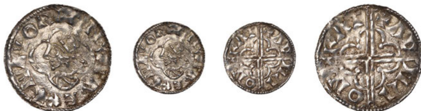
34 Penny, Quatrefoil type, Cambridge, Ada, ADMA ON GRAT (NG ligulate), 1.04g/12h (cf. BEH 1004ff; N 781; S 1157). Very fine £200-300 Provenance: Bt M. Trenerry March 2000