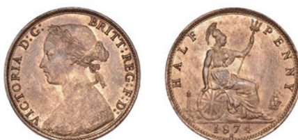
578 Halfpenny, 1874 H (F 318; BMC 1806; S 3957). Virtually as struck, full original colour £100-150