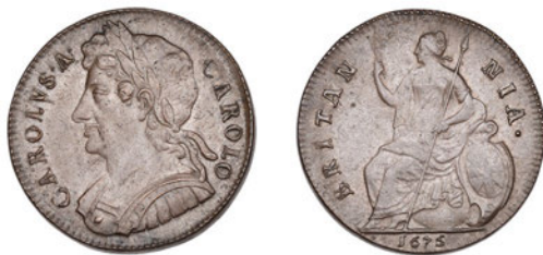
554 Halfpenny, 1675 (BMC 528; S 3393). About extremely fine and well-struck