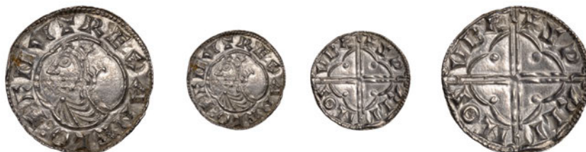
37 Penny, Quatrefoil type, Sudbury, Spirlinc, SPRLINC O SVBR, 0.83g/9h (SCBI Copenhagen 3736, same dies; BEH 3421-2; N 781; S 1157). Slightly bent, otherwise about extremely fine £200-300 Provenance: Bt M. Vosper January 1998