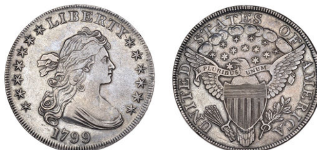
647 Dollar, 1799. Die cracks in reverse legend, good very fine, toned £1,400-2,000