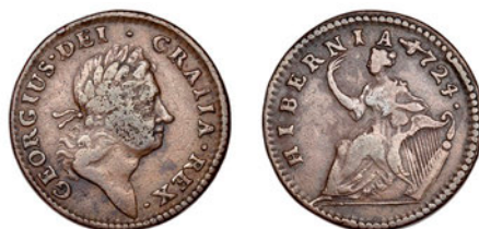
640 Wood's coinage , Halfpenny, 1724, with stop after date (Martin 4.67/K2; DF 520; S 6601). Die crack through 17 of date, nearly very fine £120-150