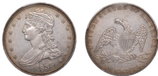
650 Half-Dollar, 1836, rev. reads 50 CENTS, grained edge. Extremely fine or better, very rare Skabbed in PCGS holder graded Genuine - Cleaning - AU details