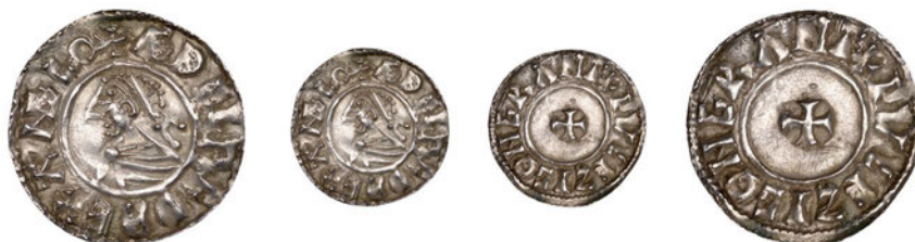
33 Penny, Last Small Cross type, Cambridge, Wulfsgie, PVLFIG ON GRANT, 1.01g/9h (BEH 1204; N 777; S 1154). Good very fine £200-300 Provenance: Bt M. Trenerry July 1997