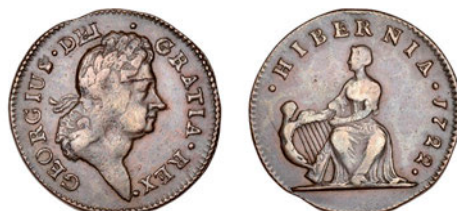
639 Wood's coinage , Halfpenny, 1722, type I (Martin 3.2/Bb3; DF 504; S 6600). Nearly very fine £200-300