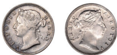
619 [or Straits Settlements], Victoria , 20 Cents [1866-1901], obverse brockage, 5.44g. Extremely fine, unusual £180-220