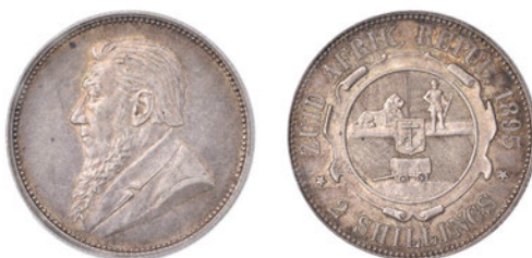
629 Paul Kruger , Florin, 1895 (Hern Z26; KM. 6). Extremely fine, toned £400-500 Slabbed in PCGS holder, graded AU 53