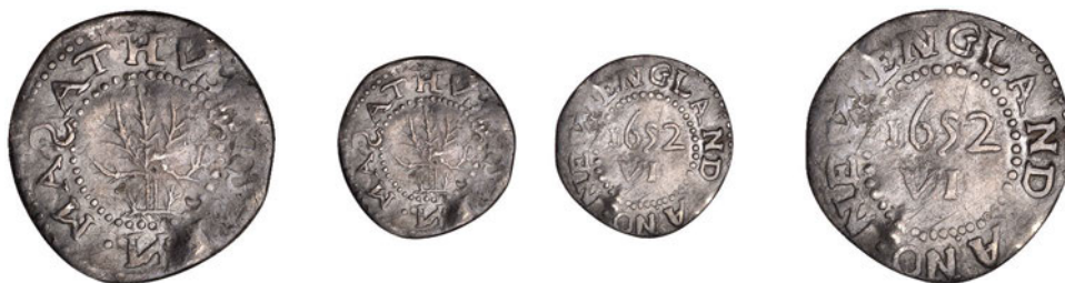
637 MASSACHUSETTS , Oak Tree coinage, Sixpence, 1652, 2.12g/12h (Noe 21; Breen 27; Whitman 400). Slightly creased and crimped, otherwise good fine £1,200-1,500