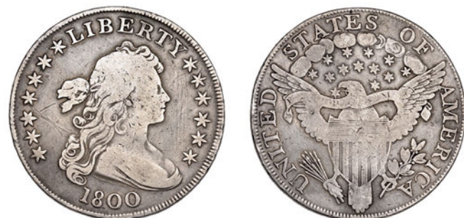
648 Dollar, 1800. Surface and edge marks, otherwise about fine £400-500