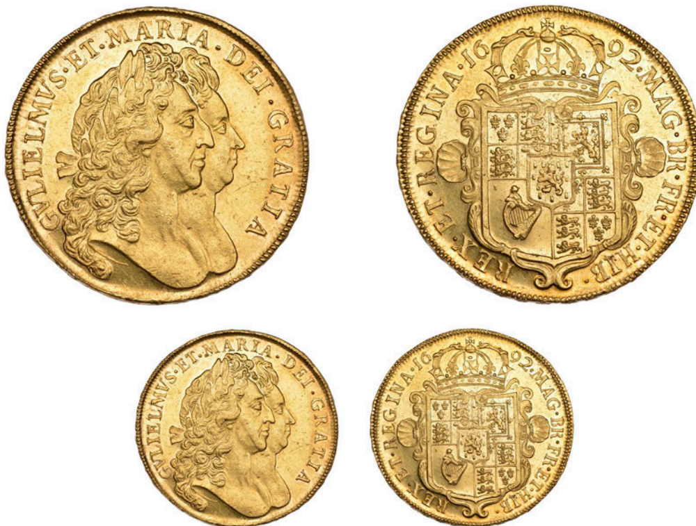
556 Five Guineas, 1692, edge quarto (MCE 138; S 3422). Minimal hairlining, otherwise good extremely fine with considerable mint bloom