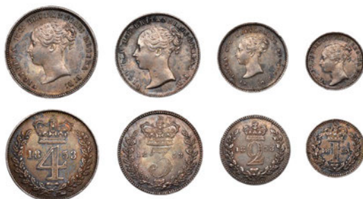
576 Maundy set, 1853 (ESC 3497; S 3916) [4]. Good extremely fine with matching dark tone, possibly Proofs £300-400 Provenance: The property of a Lady [acquired prior to 1992]