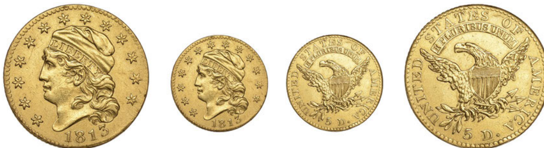
643 Five Dollars, 1813. Possibly with mount removed at 12 and 6 o'clock, otherwise good very fine £1,600-2,000