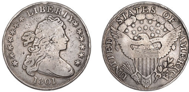
649 Dollar, 1801. Numerous surface marks, otherwise about fine