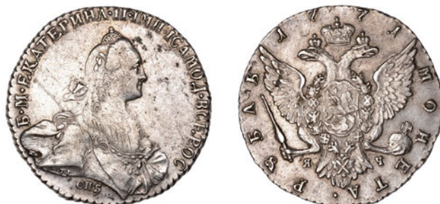
624 Catherine II , Rouble, 1771яч, St Petersburg (Uzd. 1039; KM. C67a.2). Scored on shoulder, otherwise good very fine £200-300