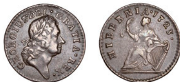
641 Wood's coinage , Farthing, 1723, type 3 (Martin 3.2/Bb1; DF 525; S 6604). Better than very fine £150-200