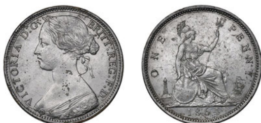
577 Penny, 1864, dies Jg, crosslet 4, 8.99g/12h (Freeman 48; Bamford 67; BMC 1663; S 3954). Trifling surface marks and spotting, otherwise extremely fine and dark-toned, very rare £600-700