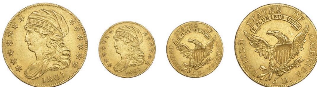
642 Five Dollars , 1807. Good very fine £2,400-3,000