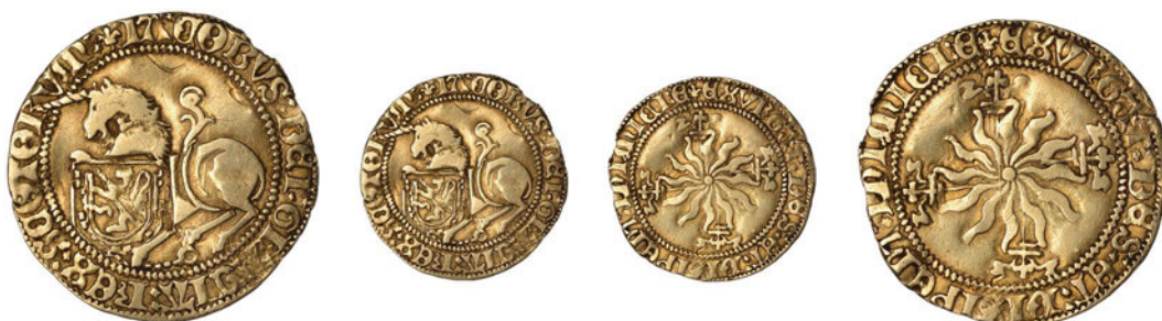
583 James IV , Unicorn, type I, mm. lis, Lombardic lettering, six-pointed star stops, 3.72g/1h (SCBI 35, 817; B 3, fig. 627; S 5316). A few obverse surface marks, otherwise nearly very fine, rare £2,400-3,000

The coins of Henri le Rus are normally poorly struck from carelessly made dies. While the style of the present coin is crude, it is unusually well struck for the issue and superior to the Burns plate coin