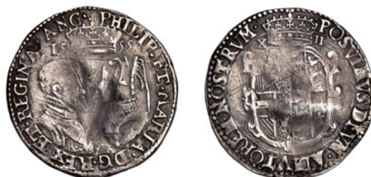
540 Shilling, 1555, English titles and mark of value, reads REGINA ANG, 6.21g/2h (N 1968; S 2501). Lightly creased and some surface scratches, otherwise good fine £200-300