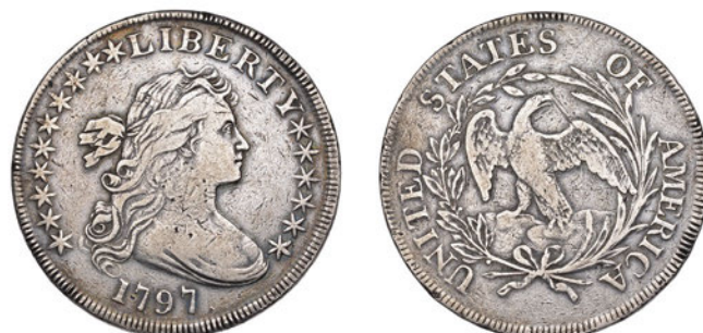
646 Dollar, 1797. Surface and edge marks, otherwise about very fine £1,600-2,000