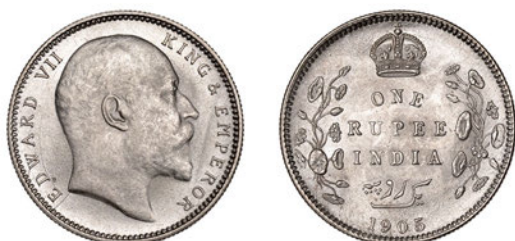
620 Edward VII , Rupee, 1905c (Stevens/Weir 7.27; Prid. 191; KM. 508). Virtually as struck £120-150