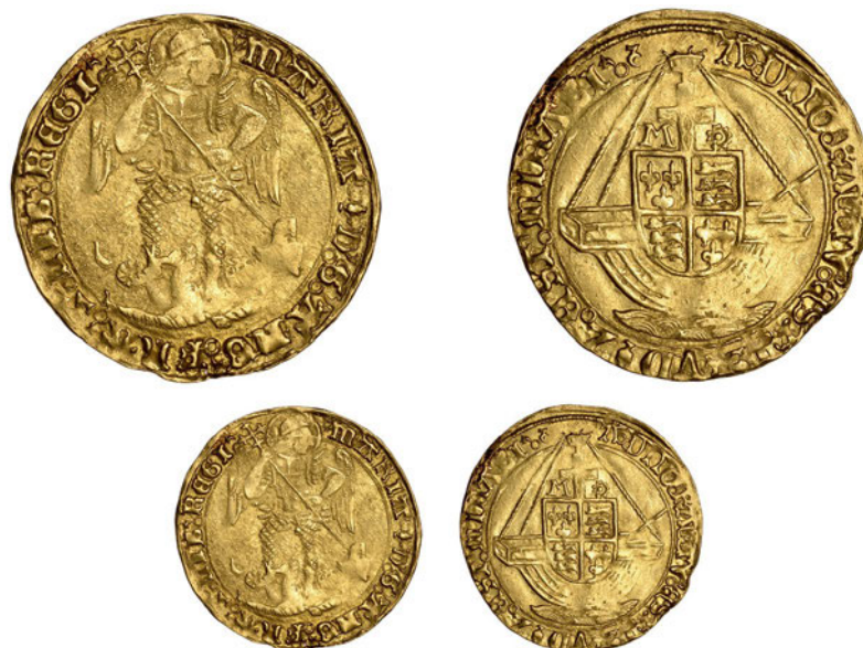
539 Angel, mm. pomegranate, annulet stops, 5.19g/2h (SCBI Schneider 710ff; N 1958; S 2490). Obverse rather weak, otherwise about very fine, reverse good very fine, very rare £5,000-6,000