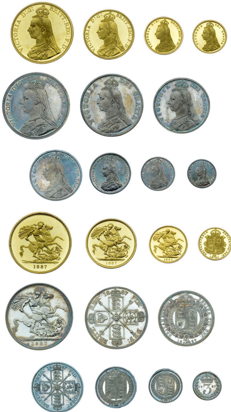
579 Proof set, 1887 , comprising gold Five and Two Pounds, Sovereign and Half-Sovereign, silver Crown to Threepence [11]. All with surface marks and hairlined, otherwise extremely fine and brilliant; in official leather case £15,000-20,000