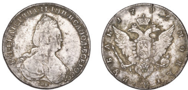
625 Catherine II , Rouble, 1796 IC , St Petersburg (KM. C67c). Some obverse marks and scored on reverse, otherwise about very fine £200-300