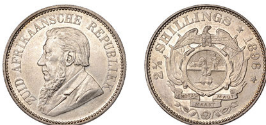
628 Paul Kruger , Halfcrown, 1896 (Hern Z34; KM. 7). Minor scuffs and surface marks, otherwise extremely fine £150-200