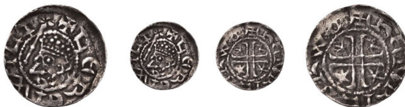
582 William the Lion , Short Cross and Stars coinage, Sterling, Phase B, Henri le Rus, crowned bust left with sceptre, LE REI WILT , rev. short cross, stars in angles, HENRI LE RVVS , 1.40g/12h (cf. SCBI 35, 78; B 32b, fig. 51b, same dies; S 5031). Good very fine, very rare £600-800

The coins of Henri le Rus are normally poorly struck from carelessly made dies. While the style of the present coin is crude, it is unusually well struck for the issue and superior to the Burns plate coin