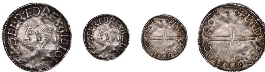
32 Penny, Long Cross type, Rochester, Eadwerd, EADPERD MEO ROFE, 1.63g/7h (BEH 3279; N 774; S 1151). Crimped and peckmarked, otherwise better than fine £100-150