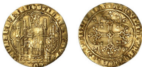
622 HOLLAND, William of Bavaria (1404-17), Ecu d'or a la chaise, 3.36g/2h (Del 731; F 112). Creased, otherwise better than fine £300-400