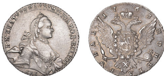
623 Catherine II , Rouble, 1763я1, St Petersburg (Uzd. 0945; KM. C67.2). Nearly extremely fine £300-400