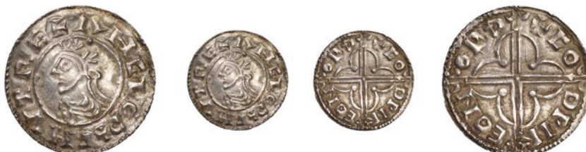
36 Penny, Quatrefoil type, Norwich, Godwine, GODPINE O NORD, obv. legend starts at 6 o'clock , 0.91g/9h (SCBI Copenhagen 3163, same dies; cf. BEH 2925; N 781; S 1157). Slightly bent, otherwise very fine or better £200-300