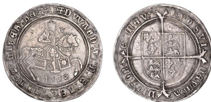
538 Third period, Fine issue, Crown, 1552, mm. tun, 30.75g/11h (Lingford dies B-13; N 1933; S 2478). Two small digs above horse's head, otherwise nearly very fine £1,200-1,500