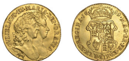
557 Guinea, 1689, elephant and castle (MCE 149; S 3427). Small dig on King's neck, otherwise nearly extremely fine

Provenance: The property of a Lady [acquired prior to 1992]