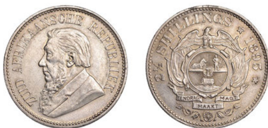
627 Paul Kruger , Halfcrown, 1895 (Hern Z33; KM. 7). A few surface marks, otherwise about extremely fine, lightly toned £150-200