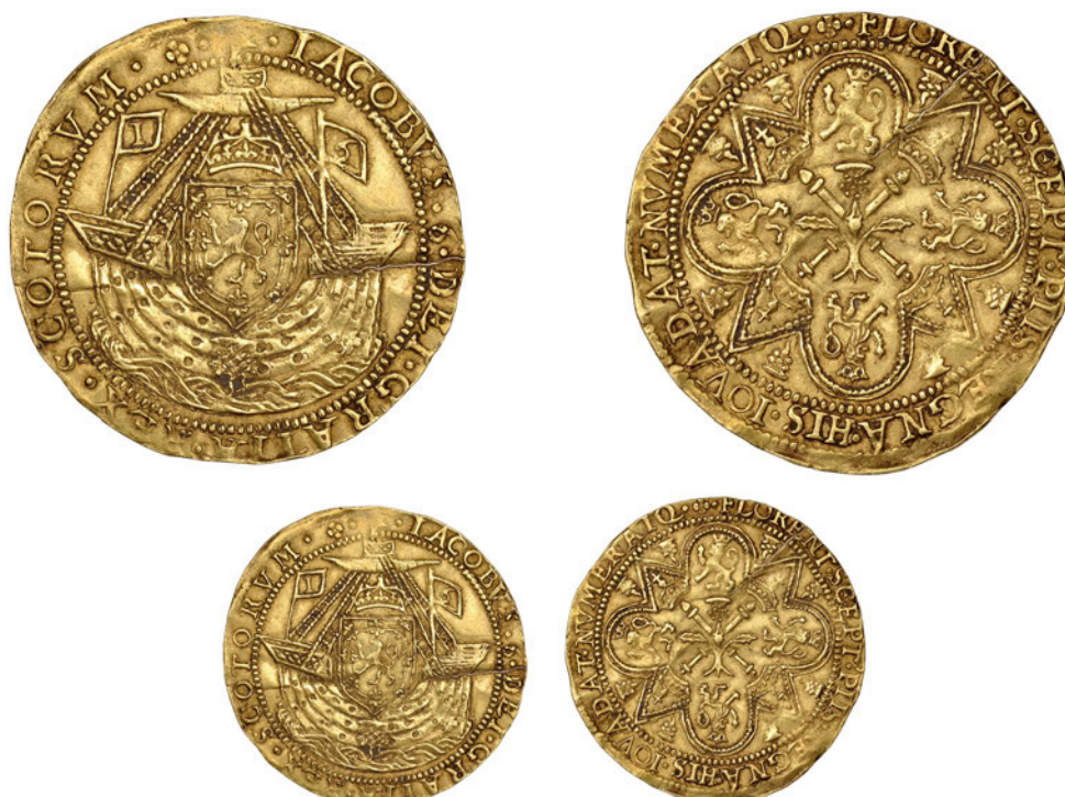
584 James VI , Fifth coinage, Thistle Noble, mm. quatrefoil, pellet stops, 7.64g/7h (cf. SCBI 35, 1148ff; SCBI 58, 1255; B 2, fig. 951; S 5456). Very slightly creased and with a 1cm crack at 4 o'clock, otherwise better than very fine, very rare £3,000-4,000