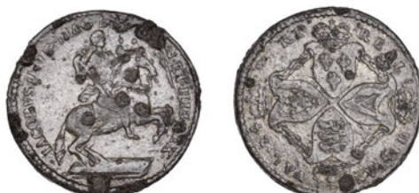
638 James II , tin Plantation Token for Twenty-Fourth of a Réal, 9.29g/3h (Prid. 1; Breen 77). Some surface corrosion and tin pest, otherwise nearly very fine £200-300