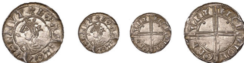
35 Penny, Quatrefoil type, Huntingdon, Godleof, GODLIOF ON HVNT, 0.88g/12h (Eaglen 167, dies Bc; SCBI Copenhagen 1283, same dies; cf. BEH 1249; N 781; S 1157). Virtually as struck £300-400 Provenance: Bt M. Vosper April 1998