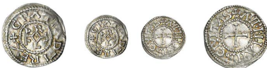
485 Charles the Bald , Denier, class 2, Orléans, rev. AVRELIANVS CIVITAS, 1.74g/4h (MEC 881). Very fine, partially toned £150-180 Provenance: SNC September 1973 (7396)