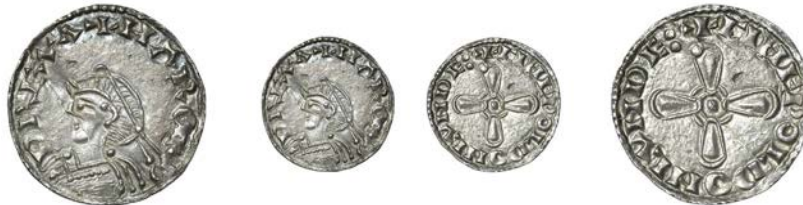
31 Penny, Jewel Cross type, London, Cyneweald, CINEPOLD ON LVNDE:, 0.91g/12h (Talvio L2A; BEH 552ff; N 802; S 1163). Lightly creased and with an obverse surface crack, otherwise nearly extremely fine and neatly struck, toned £500-700