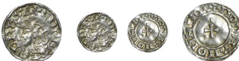
34 Penny, Radiate type, Hertford, Godman, GODMAN ON HEOR (OR ligulate), 1.05g/9h (Freeman 32; SCBI Copenhagen 890; N 816; S 1173). Crimped, otherwise very fine, rare £300-400