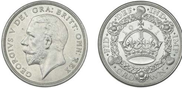
277 Crown, 1931 (ESC 3639 [371]; S 4036). Extremely fine, reverse better