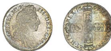
223 Sixpence, 1697, third bust, large crowns, later harp (ESC 1233 [1566]; S 3538). About as struck, nicely toned