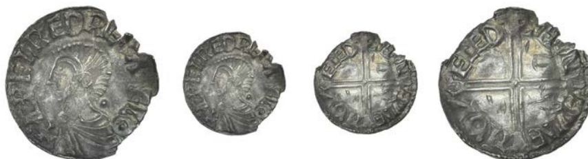
10 Penny, Long Cross type, Watchet, Hunewine, HVNEPINE M'O PECEDE, 1.70g/9h (Blackburn 11, same dies; FEJ 894, same dies; BEH 3883; N 774; S 1151). Chipped and peckmarked, otherwise very fine, very rare £200-300

Provenance: Spink Auction 200, 1 and 5 October 2009, lot 9