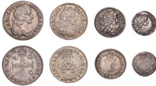
218 Maundy set, 1684, Threepence 1684/3 (ESC 607 [2380]; S 3392) [4]. Very fine