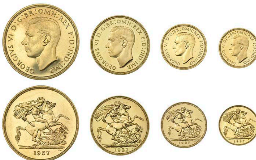
288 Proof set, 1937, comprising Five Pounds, Two Pounds, Sovereign and Half-Sovereign [4]. Minor surface marks, brilliant; in official case of issue £9,000-10,000