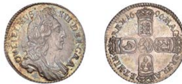
222 Sixpence, 1696, first bust, large crowns, early harp (ESC 1202 [1533]; S 3520). About as struck and attractively toned