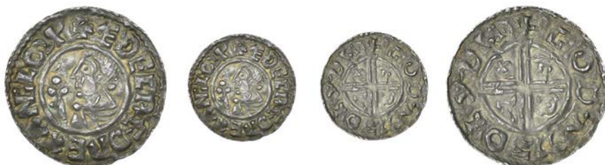
5 Penny, CRVX type, Lydford, Goda, GODA M-O LYDA, 1.21g/3h (Brettell 438, this coin ; BEH 3051; BMC 283; N 770; S 1148). A few peckmarks, otherwise about very fine and toned but with a small internal crack along inner circle £200-260

Provenance: A.J.V. Radford Collection; R.P.V. Brettell Collection, Glendining Auction, 8 March 1990, lot 438 [from Spink September 1944]