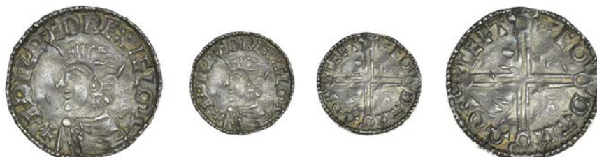
9 Penny, Long Cross type, Shaftesbury, Goda, GODA MEO SCEFT, 1.67g/7h (BEH 3344; N 774; S 1151). A few peckmarks, otherwise good very fine with old cabinet tone, rare £240-300