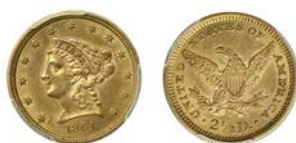
⌘ 624 USA , Two-and-a-Half Dollars, 1861, new rev. Extremely fine [slabbed PCGS AU 55] £150-180