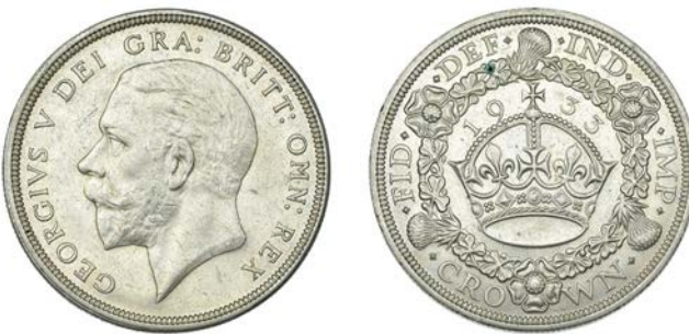
279 Crown, 1933 (ESC 3644 [373]; S 4036). Minor surface marks, otherwise extremely fine