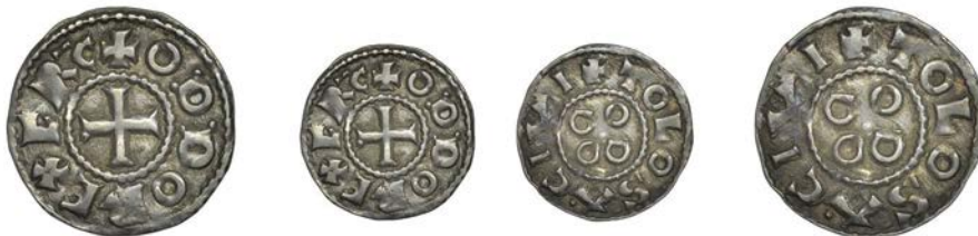
495 Odo (888-97), Denier, Toulouse, ODDO REX FR-C, CROSS, rev. TOLOSA CIVI, ODDO in centre, 1.63g/5h (MEC 988). Very fine Provenance: Glendining Auction, 20-1 March 1991, lot 640 £200-260