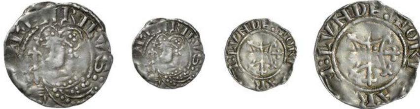
56 Penny, Quadrilateral on Cross Fleury type, London, Ordgar, ORDGAR : ON : LVNDE :, 1.40g/10h (Allen, BNJ 2012, p.94; BMC 258-9; N 871; S 1276). A little weak on face, otherwise about very fine, toned £200-300