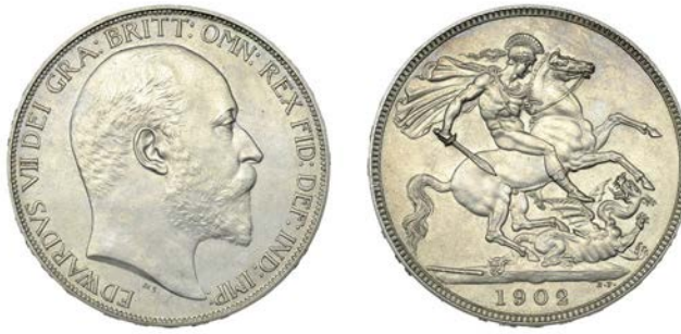
268 Proof Crown, 1902, edge II (ESC 3562 [362]; S 3979). Matt, about as struck