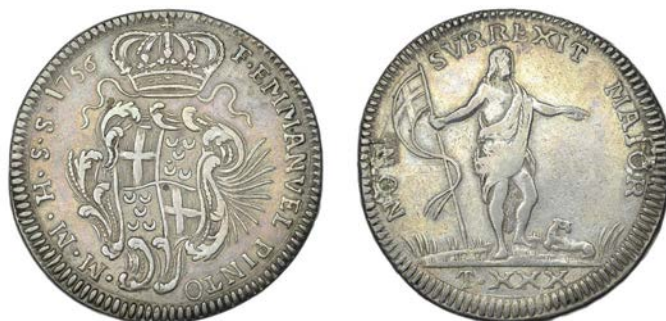
545 Emmanuel Pinto , 30 Tari, 1756, 29.04g/6h (RS p.164, 58-9; Schembri p.156, 1; KM. A256). Traces of inscription on edge, otherwise good fine or better £150-200