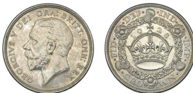
273 Crown, 1928 (ESC 3633 [368]; S 4036). Extremely fine or better