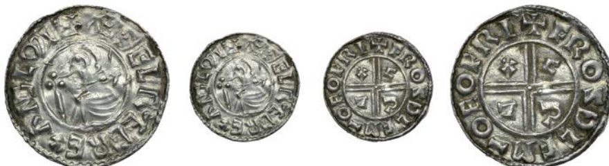
7 Penny, CRVX type, York, Frostulfr, FROSLDF M-O EOFRI, 1.41g/9h (cf. BEH 709-10; N 770; S 1148). Of bright appearance, a few peckmarks, otherwise good very fine £200-260