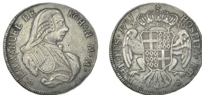
560 Emmanuel de Rohan , 30 Tari, 1781, 29.39g/6h (RS p.191, 19; Schembri p.175, 5; KM. 327). About very fine £150-180