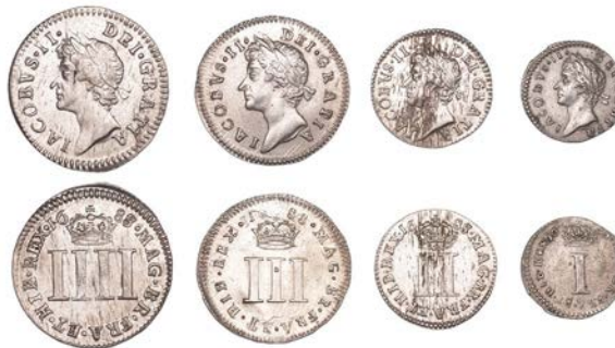
220 Maundy set, 1688, Fourpence and Twopence both 1688/7 (ESC 783 [2383]; S 3418) [4]. Lightly cleaned, otherwise about extremely fine, but Twopence haymarked on obverse