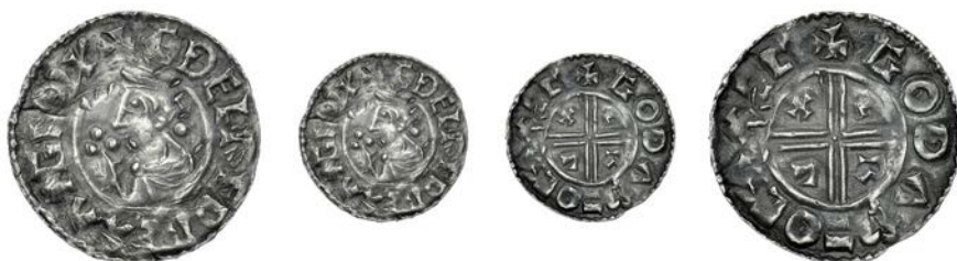
4 Penny, CRVX type, Exeter, Goda, GODA M-O EAXEC, 1.28g/9h (Brettell 69; BEH 536; N 770; S 1148). Some peckmarking, otherwise about very fine £200-260