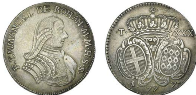
558 Emmanuel de Rohan , 30 Tari, 1777, 29.30g/6h (RS p.190, 15; Schembri p.174, 1; KM. 308). Very fine, rare £150-200