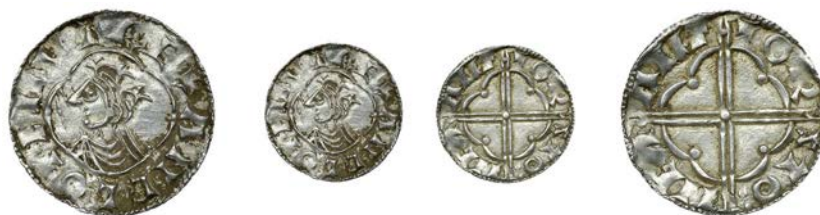
16 Penny, Quatrefoil type, Cambridge, Orest, ORST ON GRANT, 0.94g/3h (BEH 1064; N 781; S 1157). Good very fine, portrait better £240-300