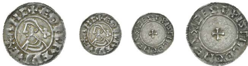
12 Penny, Last Small Cross type, Exeter, Isengod, ISEGOD ON EAXCEST, 1.07g/12h (Brettell 78; BEH 549; N 777; S 1154). Very fine or better £200-300