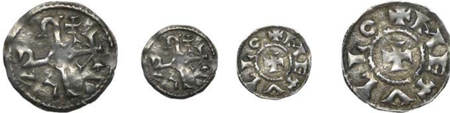
493 Charles the Bald , Obole, Melle, monogram with cross in lower left field, rev. METVLLO, cross, 0.64g/7h (MEC 964). Very fine, scarce Provenance: Bonhams/Vecchi Auction 8, 12 October 1982, lot 798 £120-150