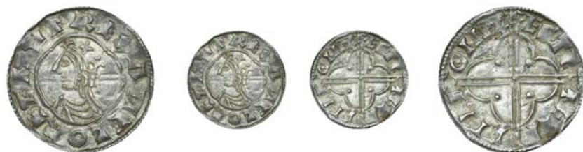
19 Penny, Quatrefoil type, Hastings, Ælfweard, ELPPERD ON HÆSTI , 0.76g/12h (HHK –; Sussex Mints –; SCBI Copenhagen 1141; BEH –; N 781; S 1157). Good very fine, portrait better, very rare £300-400