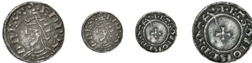
33 Penny, Radiate type, Cambridge, Eadstan, ETSAN ON GRATE, 0.96g/6h (Freeman 32; SCBI Copenhagen 878; BEH 201; N 816; S 1173). Surfaces a little rough, otherwise nearly very fine, very rare £200-300 The last letter of the mint name is uncertain; probably an E followed by a large bracket which breaks the inner circle

Provenance: From a Scandanavian Hoard; Baldwin Auction 14, 13-14 October 1997, lot 296; bt Baldwin 1998