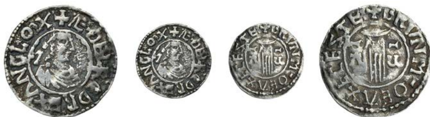
1 Penny, First Hand type, Exeter, Brun, BRVN M-O EAXECESTE, 1.43g/9h (Brettell 21; BEH 469; N 766; S 1144). Good fine but struck from rusty dies, rare; the moneyer only known in this type at Exeter Provenance: Bt S. Mitchell £150-200