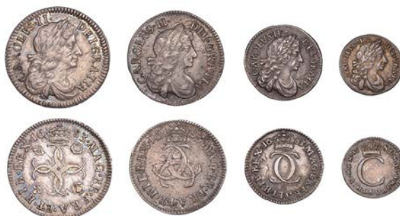
217 Maundy set, 1683 (ESC 606 [2379]; S 3392) [4]. Threepence nearly very fine, others good very fine