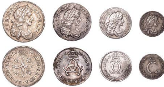
214 Maundy set, 1675 (ESC 598 [2371]; S 3392) [4]. Very fine