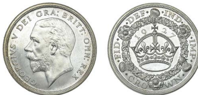
272 Proof Crown, 1927 (ESC 3631 [367]; S 4036). About mint state