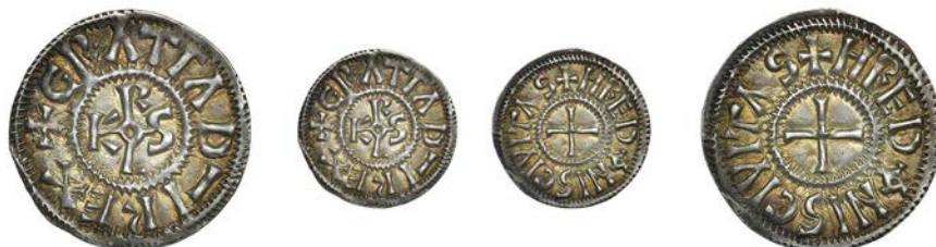
487 Charles the Bald , Denier, class 2, Rennes, rev. HREDONIS CIVITAS, 1.65g/3h (MEC 890). On a full flan, good very fine, attractively toned Provenance: Bt Spink March 1974