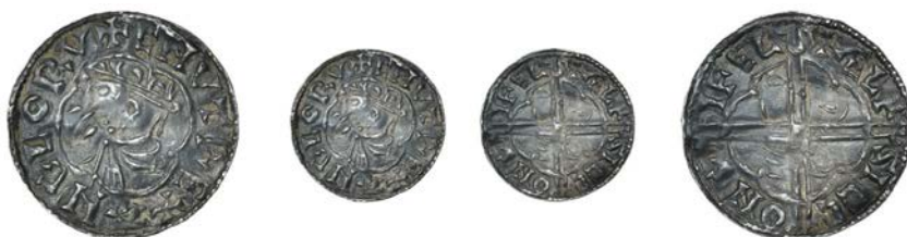
20 Penny, Quatrefoil type, Ilchester, Ælfsige, ÆLFSIGE ON GIFEL , 0.80g/9h (BEH 879; N 781; S 1157). Some peckmarks, otherwise very fine, dark tone, rare £300-400 Provenance: Bt F.J. Rist