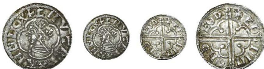
23 Penny, Quatrefoil type, Thetford, Eadwig, EDPI MON DEOD , 1.25g/1h (Carson –; BEH 3486; N 781; S 1157). Very fine or better £200-260 Provenance: Bt F.J. Rist