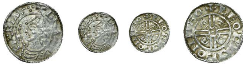
24 Penny, Pointed Helmet type, Hertford, Leofric, LEOFRIC ON HEO, 0.93g/3h (BEH –; N 787; S 1158). Very fine or better, very rare Provenance: Bt F.J. Rist