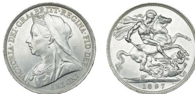
256 Crown, 1897, edge LX (ESC 2602 [312]; S 3937). A few surface marks, otherwise extremely fine or better £150-180