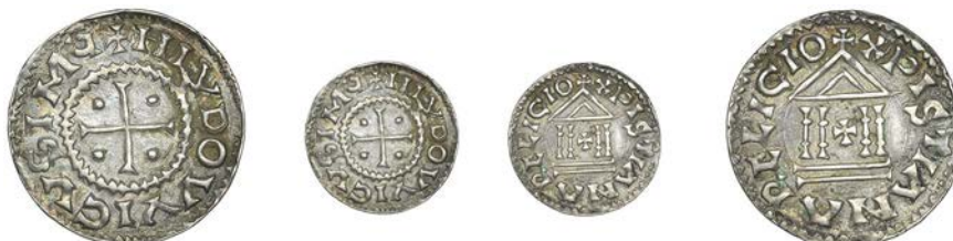
475 Louis the Pious , Denier, uncertain mint, H LVDOVVICVS IMP (P retrograde), cross with pellets in angles, rev. XPISTIANA RELIGIO, temple with cross in centre, 1.50g/10h (MEC 793ff). Very fine £150-180

Provenance: Spink Auction 24, 13 October 1982, lot 648