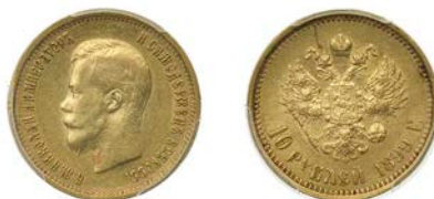
⌘ 618 RUSSIA, Nicholas II , 10 Roubles, 1899 AR (KM. Y64). Extremely fine [slabbed PCGS Scratch - AU details] £200-260