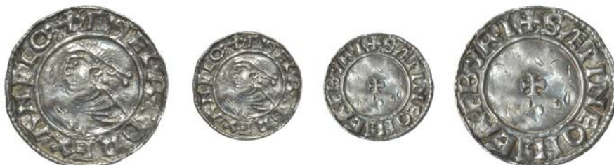
14 Penny, Last Small Cross type, Salisbury, Sæwine, SÆPINE ON SEREBYRI, 1.52g/12h (BEH 3405; N 777; S 1154). Creased and peckmarked, otherwise nearly very fine, rare £240-300 Provenance: Bt F.J. Rist May 2013