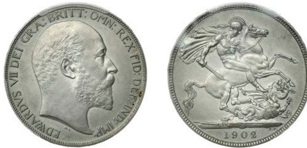
269 Proof Crown, 1902, edge II (ESC 3562 [362]; S 3979). About as struck [slabbed PCGS PR 62]