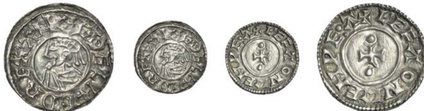
13 Penny, Last Small Cross type, Lewes, Leofa, LEFA ON LÆHPE·A, two pellets on rev. , 1.27g/6h (HHK 89; Sussex Mints –; BMC 124; BEH 1426; N 777; S 1154). Good very fine, rare £400-500