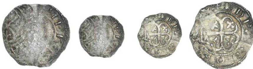
58 Penny, Cross Moline type, Canterbury, Edward, EDWARD : ON : CAN, 1.39g/9h (Allen, BNJ 2012, p.108; Mack —; N 873; S 1278). Nearly very fine and toned, an impression of the reverse covering 40% of the obverse, an unusual mis-strike £240-300 Provenance: Croydon Coin Auction 103, 9 November 1992, lot 965