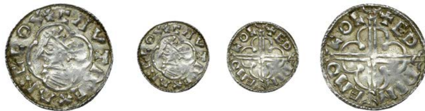
18 Penny, Quatrefoil type, Colchester, Eadwine, EDPINE MO COL , 0.99g/3h (Turner 67; BEH 218; N 781; S 1157). Very fine or better, scarce £200-260