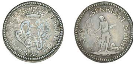
555 Emmanuel Pinto , a silver medal, undated and unsigned, shield surmounted by coronet, rev. St John with banner, 27mm, 6.80g (cf. Schembri p.210, 4; cf. DNW 138, 3003). About very fine, toned, rare £100-150