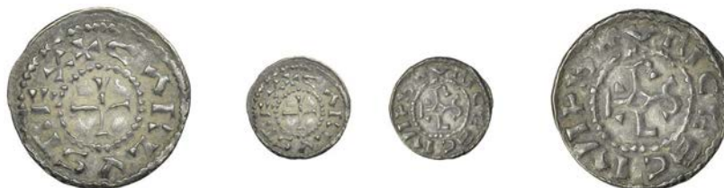
478 Charles the Bald , Obole, Bourges, CARLVS REX, CROSS, rev. BTVRICES CIVI, monogram, 0.65g/12h (MEC 839). Very fine, rare £150-200

Provenance: Vecchi Auction 1, 1-2 February 1996, lot 956