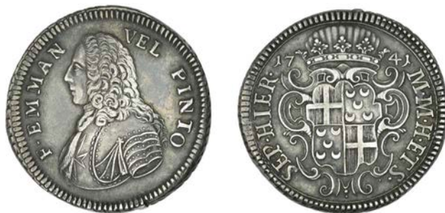
544 Emmanuel Pinto , 2 Scudi, 1741, reads F EMMANVEL, 24.33g/6h (RS p.168, 94; Schembri p.158, 1; cf. KM. 225). Well struck, good very fine, toned, very rare £300-400