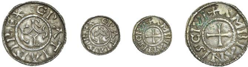
482 Charles the Bald , Denier, class 2, Amiens, rev. AMBIANIS CIVI, 1.35g/12h (MEC 850 var.). Very fine £150-180 Provenance: Bt Baldwin October 1976