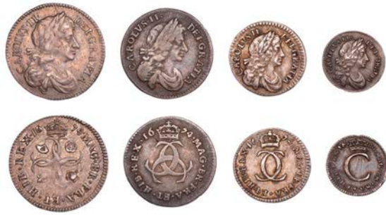
213 Maundy set, 1674 (ESC 597 [2370]; S 3392) [4]. Threepence nearly very fine, others better