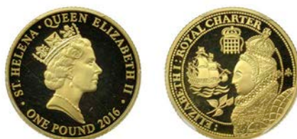
⌘ 619 ST HELENA, Elizabeth II , Pound, 2016, in gold, Elizabeth I Royal Charter. Brilliant, as struck [slabbed PCGS PR 66 DCAM] £240-300