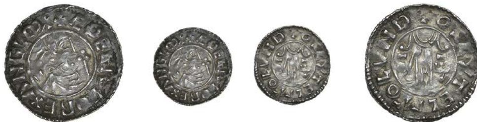
3 Penny, Second Hand type, London, Askettil, OSCYTEL M-O LVND, 1.36g/9h (BEH 2848; N 768; S 1146). A few peckmarks, otherwise nearly very fine, toned £200-260