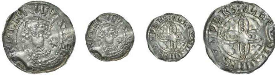
55 Penny, Pellets in Quatrefoil type, Southwark, Leofwine, LEFFINE : ON : SVDPER:, 1.03g/12h (Allen, BNJ 2012, p.100; BMC 174; N 870; S 1275). Light crease, otherwise very fine or better, rare £300-400