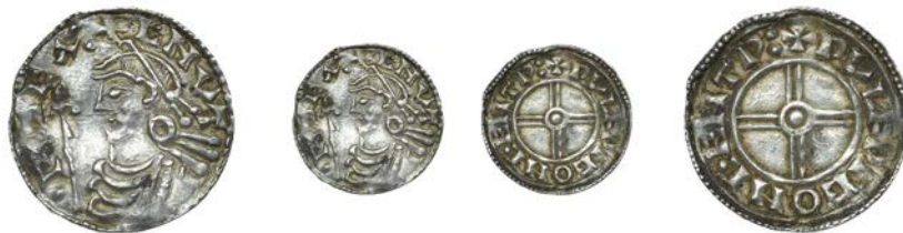
27 Penny, Short Cross type, Canterbury, Wulfwig, PVLFPIG ON CENTP:, 1.15g/3h (BEH 187; N 790; S 1159). Good very fine £200-260 Provenance: Bt F.J. Rist