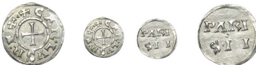
477 Charles the Bald (840-77), Denier, Paris, CARLVS REX, CROSS, rev. PARI SII in two lines, 1.67g/8h (MEC 833). Cleaned, otherwise good very fine, rare £300-400

Provenance: Vecchi Auction 1, 1-2 February 1996, lot 956