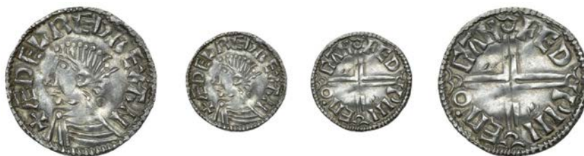
8 Penny, Long Cross type, Cambridge, Eadwine, EDPINE M'O GAN, 1.25g/10h (BEH 1168; N 774; S 1151). A few peckmarks, otherwise very fine or better £200-260