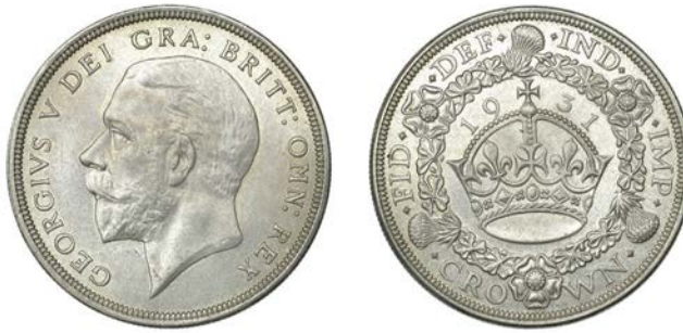
276 Crown, 1931 (ESC 3639 [371]; S 4036). Extremely fine or better