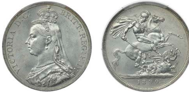
252 Crown, 1890 (ESC 2590 [300]; S 3921). About mint state, the reverse fields satiny [slabbed PCGS MS 62] £200-260