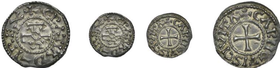
483 Charles the Bald , Denier, class 2, Chartres, rev. CARNOTIS CIVITA, 1.45g/5h (MEC 859). Good very fine £150-180 Provenance: SNC September 1973 (7395)