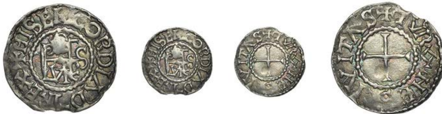
494 Louis II or III (877-82), Denier, Tours, MISERICORDIA D-I REX, monogram, rev. TVRONES CIVITAS, cross, 1.59g/5h (MEC 967). Small edge chip, otherwise better than very fine, toned, rare Provenance: Bourgey Auction (Paris), 11 May 1993, lot 95 (part) £300-400