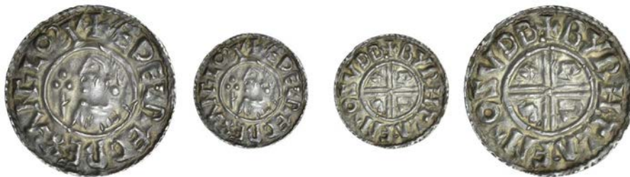
6 Penny, CRVX type, Southwark, Beorhtlaf, BYRHTLAF M-O SVDBY, 1.42g/3h (BEH 3598; N 770; S 1148). Some peckmarking, otherwise very fine or better, toned £200-260