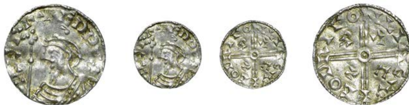
32 Penny, PACX type, Lincoln, Godric, GODRIC ON LINEA, rev. voided short cross, 1.02g/3h (Pagan 158, no. 4, this coin ; Mossop dies Bf and pl. lxvi, 13; Freeman 161; N 814; S 1172). Slightly crimped, otherwise very fine, reverse better £300-400

Provenance: From a Scandanavian Hoard; Baldwin Auction 14, 13-14 October 1997, lot 296; bt Baldwin 1998