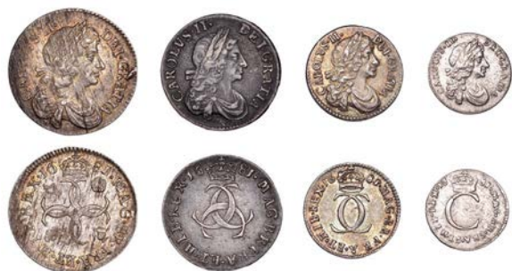
216 Maundy set, 1681 (ESC 604 [2377]; S 3392) [4]. Threepence very fine, others nearly extremely fine