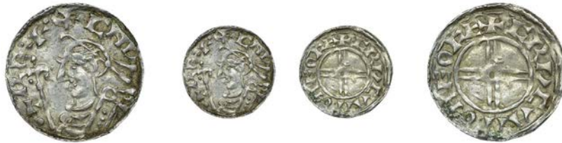
30 Penny, Short Cross type, York, Crucan, CRVCAN ON EOFE, 0.93g/4h (BEH 545; N 790; S 1159). Good very fine £200-260