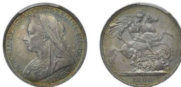
258 Crown, 1900, edge LXIII (ESC 2608 [318]; S 3937). Virtually mint state with light iridescent tone, rare [slabbed PCGS MS 65] £1,500-1,800

The finest known 1900 LXIII crown in the PCGS population report