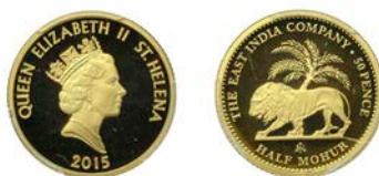
⌘ 621 ST HELENA, Elizabeth II , Fifty Pence, 2015, in gold, EIC Half-Mohur. Brilliant, as struck [slabbed PCGS PR 70 DCAM] £150-200