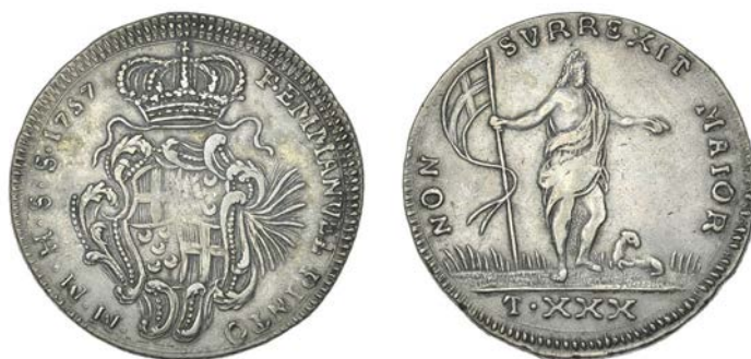
547 Emmanuel Pinto , 30 Tari, 1757, 29.32g/6h (RS p.165, 66; Schembri p.156, 4; KM. A256). Good fine or better £120-150