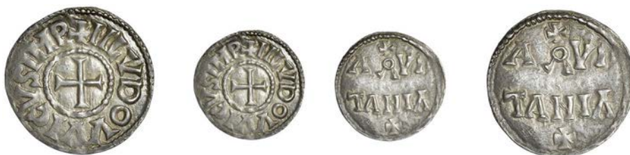
474 Louis the Pious (814-40), Denier, class 2, Aquitaine, H LVDOVVICVS IMP, CROSS, rev. AQVIT ANIA in two lines, crosses above and below, 1.72g/12h (MEC 763-4). Good very fine and toned, rare £400-500