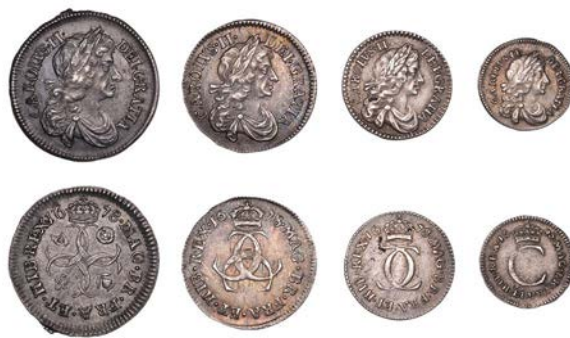
215 Maundy set, 1678 (ESC 601 [2374]; S 3392) [4]. Good very fine, toned