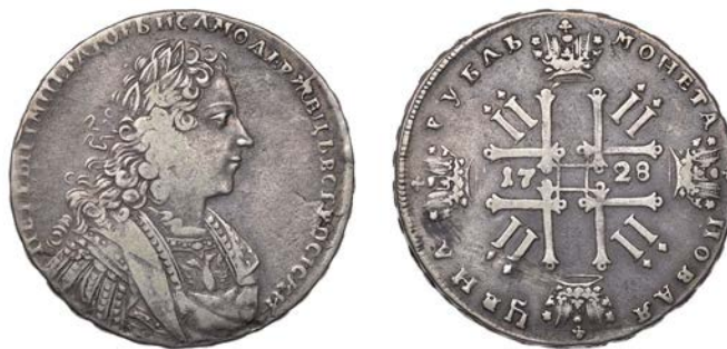
617 RUSSIA, Peter II , Rouble, 1728, Moscow, Kadashevsky (KM. 182.2; Dav. 1668). Good fine £100-150