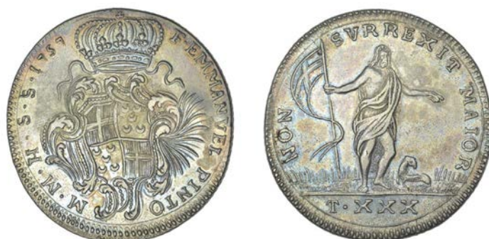
548 Emmanuel Pinto , 30 Tari, 1757, striped banner, 29.38g/6h (RS p.165, 67; Schembri p.156, 5; KM. A256). Good very fine, lightly toned, scarce £200-300