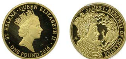
⌘ 620 ST HELENA, Elizabeth II , Pound, 2016, in gold, James I Royal Charter. Brilliant, as struck [slabbed PCGS PR 70 DCAM] £240-300