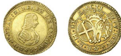
556 Francisco Ximinez de Texada (1773-5), 10 Scudi, 1773, 8.43g/12h (RS p.184, 9; Schembri p.168, 2; KM. 288; F 39). Good very fine £800-1,000