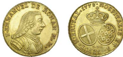
557 Emmanuel de Rohan (1775-97), 20 Scudi, 1778, 16.41g/6h (RS p.188, 3; Schembri p.173, 1; KM. 311; F 43). About extremely fine, attractive £1,000-1,500