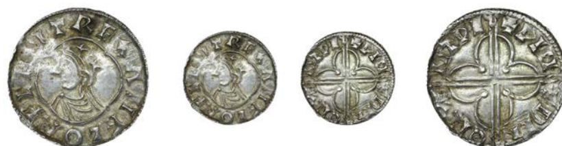
17 Penny, Quatrefoil type, Canterbury, Winedæg, PINEDEE ON CÆNTPI (NC ligulate), 0.93g/9h (cf. BEH 175; N 781; S 1157). Good very fine, scarce £240-300 Provenance: Bt F.J. Rist