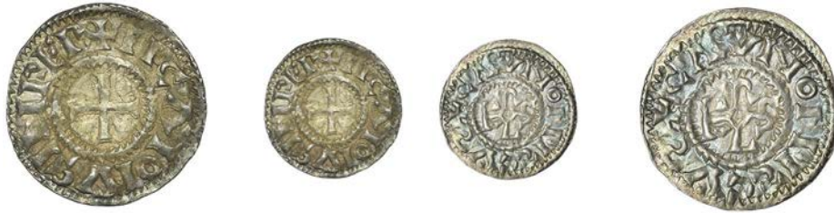
480 Charles the Bald , Denier, Chalons-sur-Saône, II CAIOIVS IMPER, CROSS, rev. CAVNONVS CVS, monogram, 1.72g/12h (MEC –). Good very fine, rare Provenance: Bt G.A. Singer September 2000 £200-300