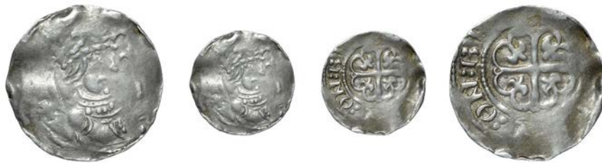
57 Penny, Cross Moline type, Bristol, Thorketill, [—]L : ON : B[—], 1.42g/9h (Allen, BNJ 2012, p.107; Mack 4c; BMC —; N 873; S 1278). Legends very weak, centres nearly very fine £200-300 Provenance: Bt F.J. Rist July 2005