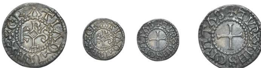
489 Charles the Bald , Denier, class 2, Tours, rev. TVRONES CIVITAS, 1.68g/12h (MEC 903). Good very fine, toned £150-180 Provenance: C.E. Blunt Collection, Spink Auction 71, 11 October 1989, lot 385