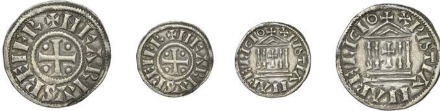
481 Charles the Bald , Denier, Clermont, N KARLVS REI FR, CROSS with pellets in angles, rev. XPSTIANA RELIGIO, temple with cross in centre, 1.68g/9h (MEC –; Coupland, NC 1991, pl. 23, nos. 38-9). Some old scratches, otherwise very fine, rare Provenance: Bourgey Auction (Paris), 11 May 1993, lot 88 £200-260