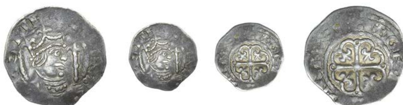
60 Penny, Cross Moline type, Thetford, Geffrei, GE[—] ON : TETF :, 1.37g/1h (Allen, BNJ 2012, p.116; Mack 37b; BMC 107; N 873; S 1278). Legends part flat, otherwise about very fine, toned £300-400