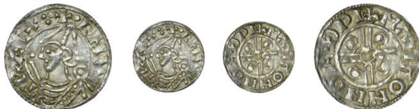
26 Penny, Pointed Helmet type, Norwich, Manna, MANA ON NORDPI, 1.06g/6h (BEH 2953; N 787; S 1158). Good very fine or better £200-260