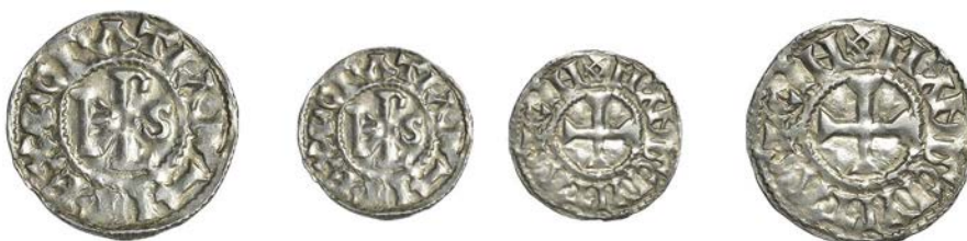
497 Charles the Simple (897-922), Denier, Le Mans, monogram, rev. CINOMANIS CIVITAS, cross, 1.40g/8h (MEC 993). Very fine £120-150