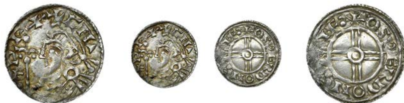
29 Penny, Short Cross type, Stamford, Osward, OSPERD ON STANF:, 0.74g/10h (BEH 3341; N 790; S 1159). Light weight but undoubtedly an official issue, good very fine or better £200-260

Matathan is one of several Irish names (like Crinan and Crucan) that appear on coins of York and Lincoln at this time, presumably due to the cities' connections with the Hiberno-Norse Vikings of Dublin. The name Balluc is probably a Gaelic surname although Veronica Smart briefly considers an alternative meaning (Mossop, p.25)