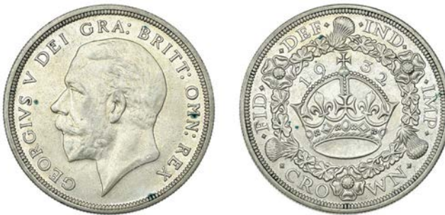
278 Crown, 1932 (ESC 3641 [372]; S 4036). Light surface marks and carbon spots, otherwise nearly extremely fine