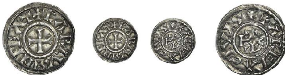
490 Charles the Bald , Denier, Arles, CARLVS INPEAT, CROSS, rev. ARELA CIVIS, monogram, 1.53g/4h (MEC 912 var.). Good very fine, scarce Provenance: Bt Spink May 1973