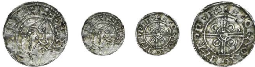
25 Penny, Pointed Helmet type, Lewes, Leofa, LEOPA ON ON LÆPPEE:, 0.98g/3h (cf. HHK 163ff; cf. Sussex Mints 133; BEH 1283; N 787; S 1158). Crimped and peckmarked, otherwise nearly very fine, very rare, the error reading not recorded by King Provenance: Bt F.J. Rist