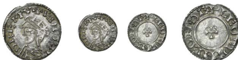
35 Penny, Radiate type, Thetford, Leofwine, LEOPFINE ON DE, 0.78g/12h (Carson 16; Freeman 172; BMC –; N 816; S 1173). Very fine or better £200-260 Provenance: Bt F.J. Rist