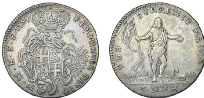
549 Emmanuel Pinto , 30 Tari, 1757, striped banner, 29.10g/6h (RS p.165, 67; Schembri p.156, 5; KM. A256). Nearly very fine, toned £150-200