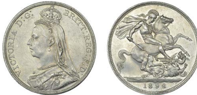
253 Crown, 1892 (ESC 2592 [302]; S 3921). About mint state, the reverse with proof-like fields £150-200