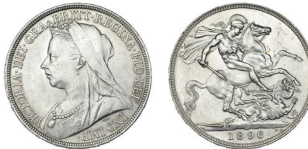
255 Crown, 1896, edge LX (ESC 2601 [311]; S 3937). A few minor rim nicks, otherwise good extremely fine £180-220