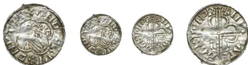
21 Penny, Quatrefoil type, Norwich, Hwætman, HVPATEMAN O NOR , 1.02g/3h (BEH 2929; N 781; S 1157). Lightly creased, otherwise very fine £150-200