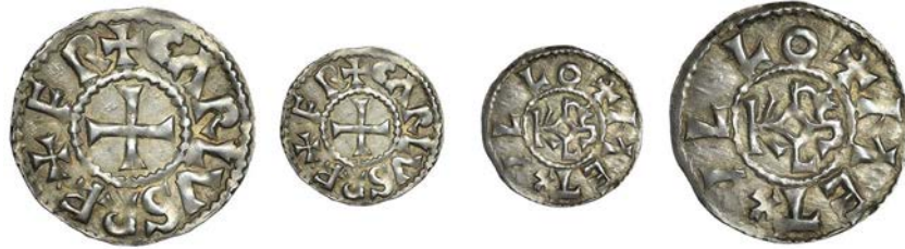
492 Charles the Bald , Denier, Melle, CARLVS REX FR, CROSS, rev. METXVLLO, monogram, 1.70g/4h (MEC 935ff). Good very fine Provenance: Bt Spink September 1975 £120-150