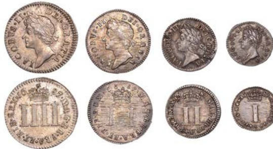
219 Maundy set, 1687, Fourpence 1687/6 (ESC 782 [2382]; S 3418) [4]. Twopence very fine, others extremely fine