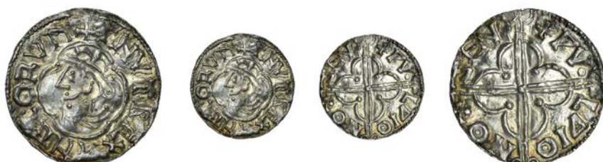
22 Penny, Quatrefoil type, Oxford, Wulfwig, PV-LPI ON OXSEN , early Oxford style, bust with pointed nose, 1.13g/9h (Blackburn/Lyon, Oxford e; BEH 3055-6; N 781; S 1157). Crimped, otherwise better than very fine, lightly toned, scarce £300-400 Provenance: Bt F.J. Rist