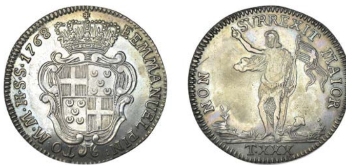
554 Emmanuel Pinto , 30 Tari, 1768, 28.76g/6h (RS p.166, 91; Schembri p.157, 17; KM. 266). Edge possibly filed, cleaned and now retoned, otherwise good very fine £150-200