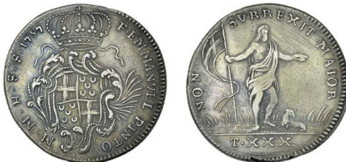
550 Emmanuel Pinto , 30 Tari, 1757, striped banner, 28.76g/6h (RS p.165, 67; Schembri p.156, 5; KM. A256). About very fine, surfaces dull £150-200