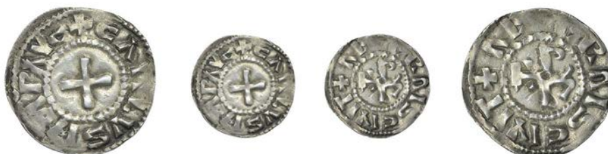
491 Charles the Bald , Denier, Nevers, CARLVS IMP AVC, CROSS, rev. NEVERNIS CIVIS, monogram, 1.52g/4h (MEC 919-20). Very fine Provenance: Bt Spink October 1973