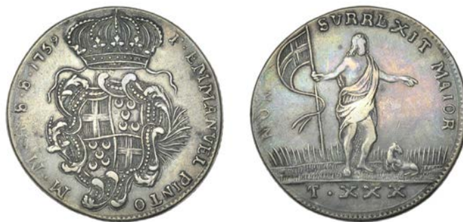
551 Emmanuel Pinto , 30 Tari, 1759, 29.18g/6h (RS p.166, 76; Schembri p.157, 9; KM. A256). Nearly very fine, toned £150-200