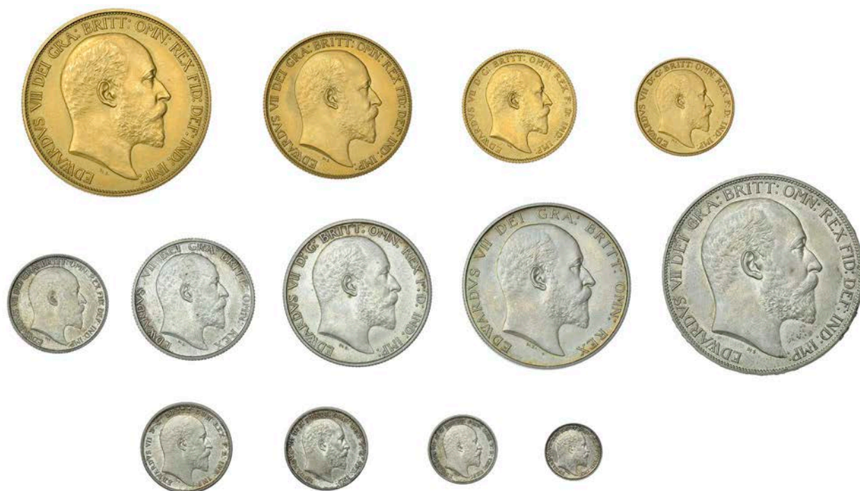
287 Proof set, 1902, comprising Five Pounds, Two Pounds, Sovereign and Half-Sovereign, Crown to Maundy Penny [13]. Matt, the silver toned, about as struck; in official red case of issue £4,500-5,000