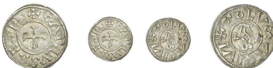
479 Charles the Bald , Denier, Toulouse, CARLVS REX F, CROSS, rev. TOLVSA CIVI, monogram, 1.43g/8h (MEC 841 var.). Very fine £120-150

Provenance: Bt G.A. Singer September 2000