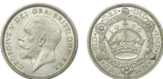
280 Crown, 1936 (ESC 3649 [381]; S 4036). Minor surface marks, otherwise good vextremely fine, toned