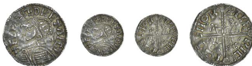
11 Penny, Helmet type, Norwich, Ælfric, ÆLFRIC M-O NOR, 1.14g/6h (BEH 3102; N 775; S 1152). A little crimped and peckmarked, otherwise very fine, toned £200-260

Provenance: Spink Auction 200, 1 and 5 October 2009, lot 9