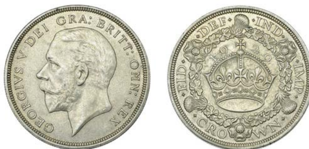
275 Crown, 1929 (ESC 3636 [369]; S 4036). Good very fine, reverse better