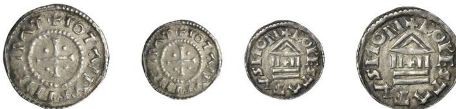
476 Lothar I (840-55), Denier, Dorestad, IOTAMVS IPIEIPAT, cross with pellets in angles, rev. DORESTATVS MON, temple, 1.68g/6h (MEC 819). Very fine, scarce £300-400

Provenance: Spink Auction 24, 13 October 1982, lot 648