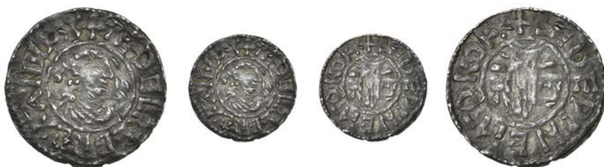
2 Penny, First Hand type, Rochester, Siduwine, SIDEPINE M-O ROF, 1.57g/12h (cf. BEH 3304; N 766; S 1144). Peckmarked, crude style, good fine, toned £150-200