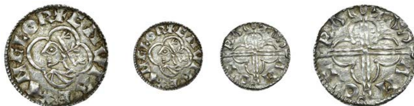
15 Penny, Quatrefoil type, Cambridge, Ada, ADA MON GRAT (NG ligulate), 1.02g/9h (BEH 1004; N 781; S 1157). Very fine £200-260