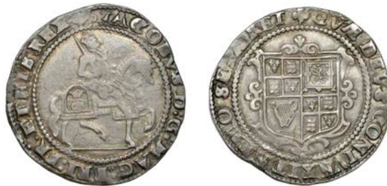
280 Third coinage, Halfcrown, mm. trefoil, ground line below horse, 14.81g/3h (N 2122; S 2666). Very fine, reverse better, attractively toned £800-£1,000