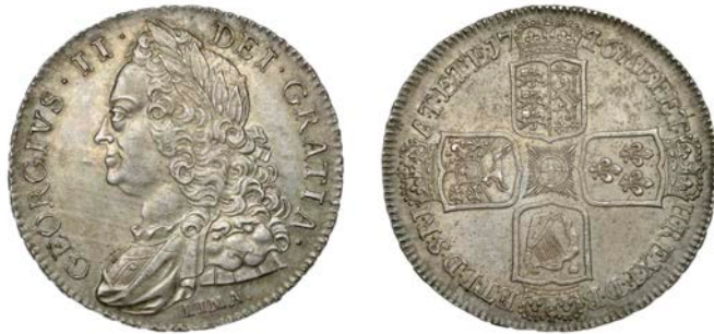
353 Crown, 1746 LIMA, edge DECIMO NONO (ESC 1668 [125]; S 3689). Good extremely fine, attractively toned £3,000-£3,600