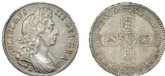
226 Halfcrown, 1696 N , small shields, edge OCTAVO (ESC 1083 [538]; S 3479). Very fine, scarce