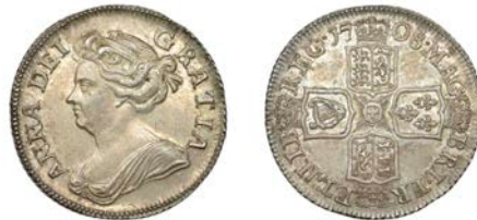
348 Shilling, 1708, third bust (ESC 1399 [1147]; S 3610). About as struck, toned