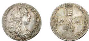
443 Sixpence, 1696N, first bust, large crowns, early harp (ESC 1288 [1538]; S 3524). File marks on King's hair (and corresponding on reverse), otherwise nearly extremely fine