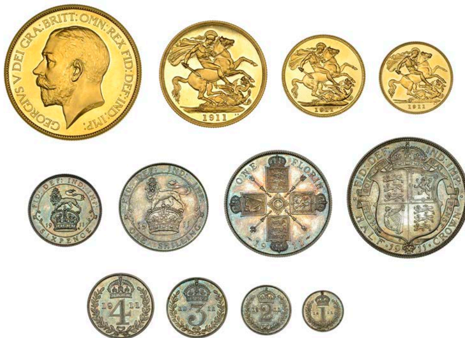
402 Proof set, 1911, comprising Five Pounds, Two Pounds, Sovereign and Half-Sovereign, Halfcrown to Maundy Penny [12]. Virtually mint state, gold brilliant, silver with light matching tone; in official case of issue £15,000-£18,000