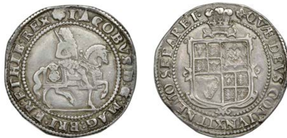
281 Third coinage, Halfcrown, mm. trefoil (over lis on obv. [?]), ground line below horse, plume above shield, 14.62g/4h (N 2123; S 2667). Portrait slightly smoothed, otherwise very fine, reverse better, old cabinet tone £1,200-£1,500 Provenance: H.M. Lingford Collection, Part II, Glendining Auction, 20-1 June 1951, lot 1258; bt Spink