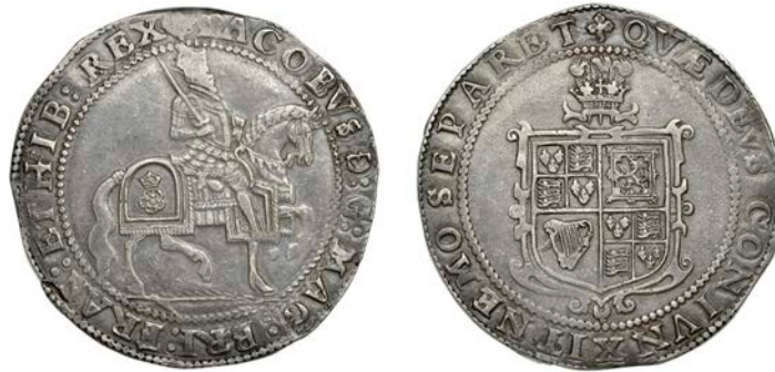
279 Third coinage, Crown, mm. trefoil (over lis both sides), plume over shield, 29.77g/9h (FRC dies X*/XIX* [Sale, lot 36]; N 2121; S 2665). Nearly extremely fine with old cabinet tone £3,000-£4,000