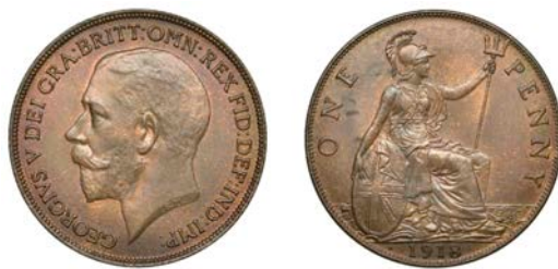
400 Penny, 1918 H (F 183; BMC 2253; S 4052). Better than extremely fine with muted original colour