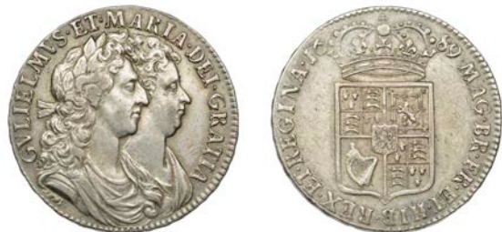
223 Halfcrown, 1689, first busts, second shield, pearls, no frosting, edge PRIMO (ESC 845 [511]; S 3435). Very fine