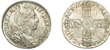
444 Sixpence, 1697, third bust, large crowns (ESC 1233 [1566]; S 3538). About mint state