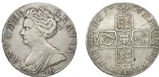
448 Crown, 1708/7 E , second bust, edge SEPTIMO (ESC 1355 [107]; S 3600). Some adjustment marks and a small flan flaw on reverse, otherwise about very fine

Provenance: DNW Auction 97, 7 December 2011, lot 295