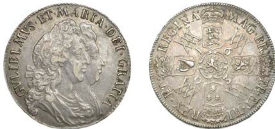
438 Halfcrown, 1693/3 inverted, edge QVINTO, F of FR OVER E (ESC 859 [521 var.]; S 3436). Good very fine £500-£700