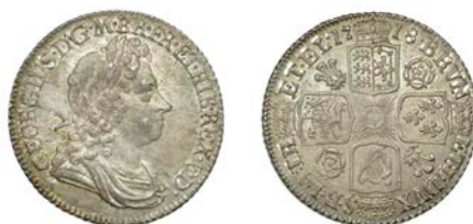
351 Shilling, 1718, roses and plumes (ESC 1566 [1165]; S 3645). Virtually as struck with mint bloom beneath cloudy toning