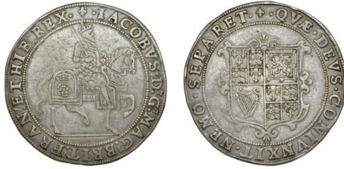
278 Second coinage, Crown, mm. lis, 29.53g/5h (FRC dies IV/VI [Sale, lot 21]; N 2097; S 2652). Evenly struck with good detail, very fine or better £4,000-£5,000