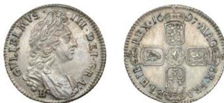
230 Shilling, 1697 B , first bust (ESC 1161 [1095]; S 3498). Extremely fine and toned, scarce