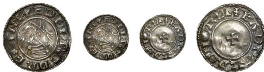
8 Penny, Last Small Cross type, Norwich, Eadwacer, EADPACR O NORDP , 1.39g/10h (BEH 3119; N 777; S 1154). Wavy flan, some peck-marks, otherwise very fine, toned £150-£180 Provenance: E.L. Judson Collection, Part II, DNW Auction 55, 8 October 2002, lot 1042