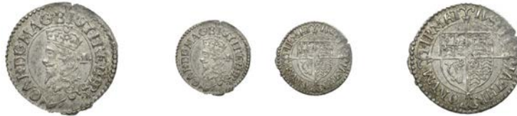
296 Penny, no mm., signed \mathfrak{b} below bust, 0.42g/9h (SCBI Brooker 722; N 2303; S 2857). Extremely fine or better £200-£260