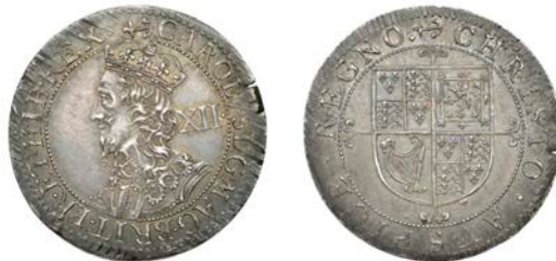
297 Shilling, mm. anchor to right, signed \mathfrak{b} both sides, 5.89g/6h (SCBI Brooker 725-6, same dies; N 2305; S 2859). Tiny edge split, otherwise nearly extremely fine £800-£1,000 Provenance: L.E. Bruun Collection, Sotheby Auction, 18-22 May 1925, lot 753 (part)