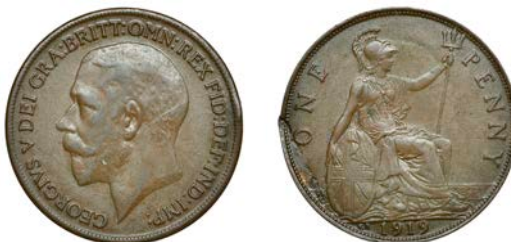
401 Penny, 1919 KN (F 187; BMC 2257; S 4053). Good very fine but flan split at 9 o'clock on reverse, rare