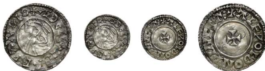
9 Penny, Last Small Cross type, Winchester, Ælfweald, ALFPOLD ON PINCST ., 1.30g/12h (Winchester Mint 716; BEH 4092; N 777; S 1154). Very fine and toned £150-£180