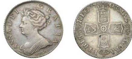
451 Shilling, 1703 VIGO, second bust (ESC 1388 [1131]; S 3586). Very fine and toned