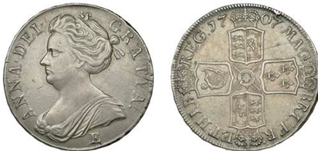
447 Crown, 1707 E , second bust, edge SEXTO (ESC 1352 [103]; S 3600). A few surface marks, otherwise good very fine and toned