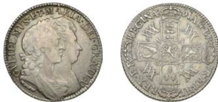
225 Shilling, 1693 (ESC 868 var. [1076]; S 3437). About very fine