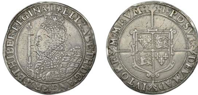
274 Seventh issue, Crown, mm. 1, sceptre points to G of REGINA, 29.81g/7h (FRC A-2 [Sale, lot 2]; N 2012; S 2582). Some minor surface cracking, otherwise better than very fine and toned, the variety very rare