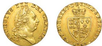
457 Guinea, 1787, fifth bust (MCE 391; S 3729). Good very fine