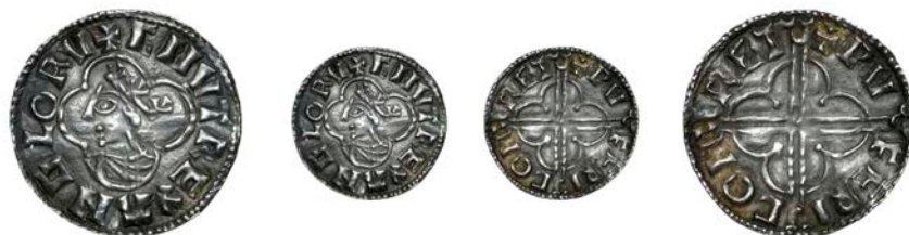
10 Penny, Quatrefoil type, Hertford, Wulfric, PVFERIC ON RET , 0.91g/12h (BEH –; N 781; S 1157). Very fine and dark-toned, scarce £240-£300