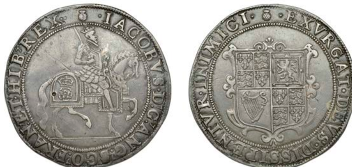
277 First coinage, Crown, mm. thistle, 29.81g/12h (FRC dies I/II [not in Sale]; N 2070; S 2643). Tiny drill-hole on housing, otherwise good very fine or better with attractive dark tone, the combination of dies very rare