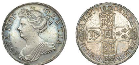
232 Halfcrown, 1708, edge SEPTIMO (ESC 1370 [577]; S 3604). Extremely fine, attractively toned