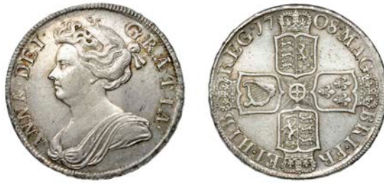
347 Halfcrown, 1708, edge SEPTIMO (ESC 1370 [577]; S 3604). Better than extremely fine