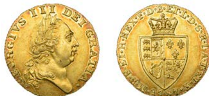
456 Guinea, 1787, fifth bust (MCE 391; S 3729). Scratch in front of face, otherwise about extremely fine with some brilliance