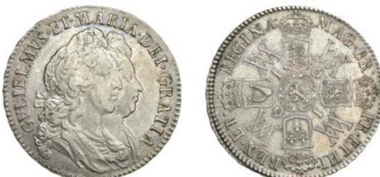
224 Halfcrown, 1691, second busts, edge TERTIO (ESC 850 [516]; S 3436). Very fine