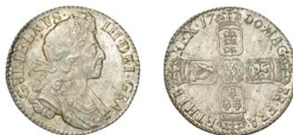
442 Shilling, 1700, fifth bust (ESC 1150 [1121]; S 3516). Good extremely fine or better, lightly toned