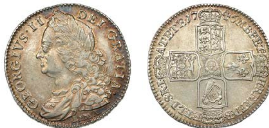
454 Halfcrown, 1746 LIMA, edge DECIMO NONO (ESC 1688 [606]; S 3695A). Good very fine with some toning