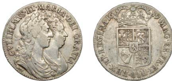
437 Halfcrown, 1689, second shield, no frosting, pearls, edge PRIMO (ESC 845 [511]; S 3435). About very fine £150-£180