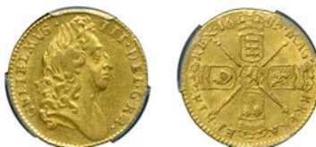
439 Half-Guinea, 1695 (MCE 189; S 3466). Good very fine [slabbed PCGS AU 55]