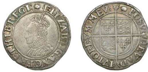
273 Sixth issue, Shilling, mm. tun, bust 6B, 5.87g/3h (N 2014; S 2577). Very fine or better