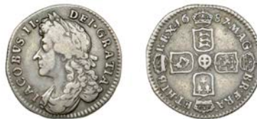
222 Sixpence, 1687, late shields over early shields (ESC 778 [1526C]; S 3413). Good fine, rare