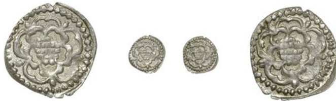
295 Halfpenny, no mm., rose both sides (SCBI Brooker 704; N 2274; S 2851). Extremely fine or better £100-£120