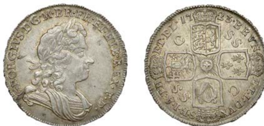
350 Halfcrown, 1723 ss c, edge DECIMO (ESC 1557 [592]; S 3643). Better than extremely fine, lightly toned