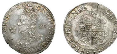
299 Shilling, mm. book, large bust, small mark of value, no inner circle, plume over shield, beaded inner circle, 6.00g/4h (Morr. A-2; cf. SCBI Brooker 750-1; N 2329; S 2882). Good very fine with a well-detailed portrait, rare £1,800-£2,200 Provenance: B.R. Osborne Collection, Glendining Auction, 23 April 1991, lot 280; A. Morris Collection