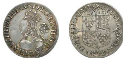
276 Milled coinage, Sixpence, 1562, mm. star, bust B, plain dress, medium rose, 3.11g/6h (Borden/Brown 23, O2/R2; N 2025/2; S 2594). Usual die flaw in reverse field, otherwise nearly extremely fine with attractive cabinet tone