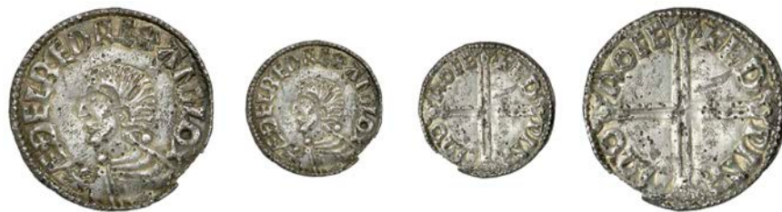
6 Penny, Long Cross type, Rochester, Eadwine, EDPINE MDO ROFE , 1.47g/12h (BEH 3286; N 774; S 1151). Some pitting and a small edge chip, otherwise very fine, rare £200-£260