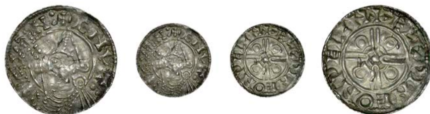
11 Penny, Pointed Helmet type, Wallingford, Ælfwine, ÆLFPINE ON PELIN , 1.10g/6h (BEH 3591; N 787; S 1158). Small crack in centre, otherwise very fine and toned, scarce £200-£260