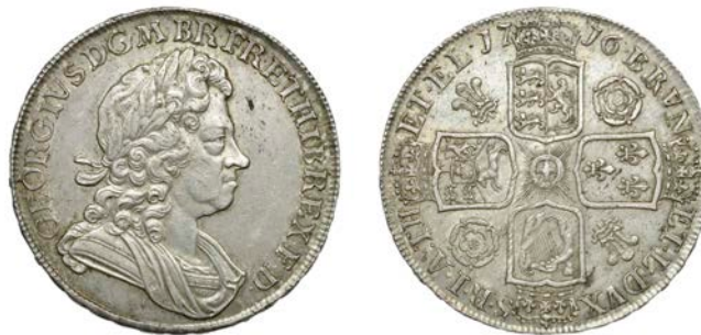
349 Crown, 1716, roses and plumes, edge SECUNDO (ESC 1540 [110]; S 3639). Extremely fine or better