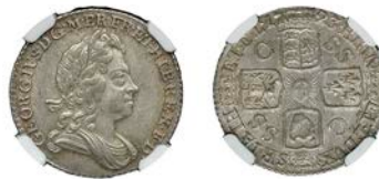
453 Sixpence, 1723 ss c, small lettering on obv. (ESC 1612 [1600]; S 3652). Extremely fine and toned [slabbed NGC MS 63]