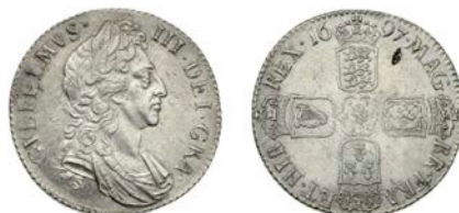
440 Shilling, 1697, third bust (ESC 1128 [1102]; S 3505). Extremely fine with mint bloom Provenance: Spink Auction 183, 26-7 September 2006, lot 151