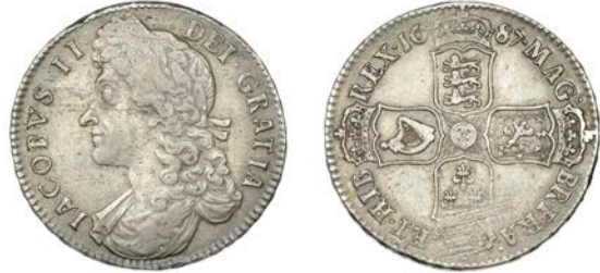
220 Halfcrown, 1687, second bust, edge TERTIO (ESC 756 [500]; S 3409). Minor weakness, otherwise very fine, rare