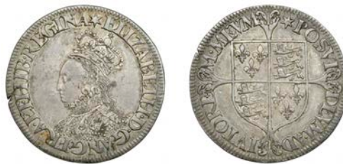
275 Milled coinage, Shilling, mm. star, small flan, 6.10g/6h (Borden/Brown 17, O1/R1; N 2023; S 2592). Tiny edge split, otherwise better than very fine, toned