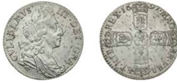
445 Sixpence, 1697, third bust, large crowns (ESC 1233 [1566]; S 3538). Good extremely fine with mint bloom