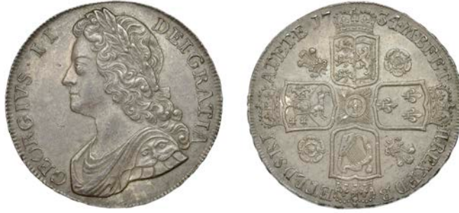
352 Crown, 1734, roses and plumes, edge SEPTIMO (ESC 1662; S 3686). Good extremely fine with dark tone over reflective fields £3,000-£3,600