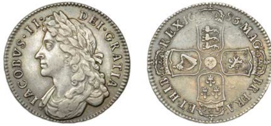
219 Halfcrown, 1686, first bust, edge SECUNDO (ESC 749 [494]; S 3408). Very fine