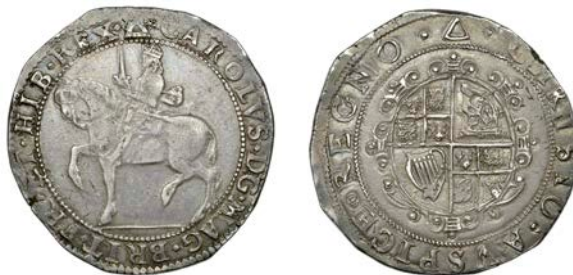
298 Halfcrown, muled with Tower rev., mm. triangle (over anchor to right on obv. ), Briot's lozenge stops on obv. , oval garnished shield, 15.00g/3h (Bull 471/23 (4-9), this coin ; SCBI Brooker 734, this coin ; N 2307; S 2861/2773). Good very fine, reverse better, with old cabinet tone; one of the best examples the cataloguer has seen, extremely rare £5,000-£6,000 Provenance: R.C. Lockett Collection, Part II, Glendining Auction, 11-17 October 1956, lot 2354; J.G. Brooker Collection; bt Spink 2007