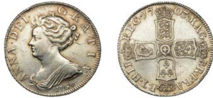
450 Shilling, 1703 VIGO (ESC 1388 [1131]; S 3586). Good very fine