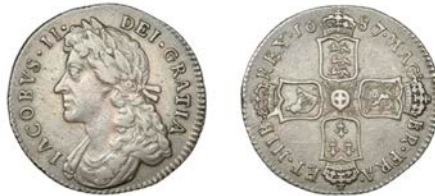
221 Shilling, 1687/6 (ESC 769 [1072]; S 3410). Die flaws on reverse, very fine