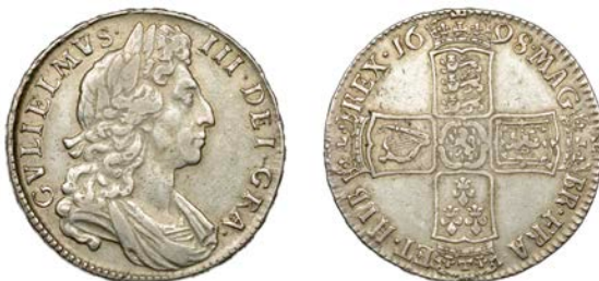
228 Halfcrown, 1698, first bust, modified large shields, edge DECIMO (ESC 1034 [554]; S 3494). Very fine