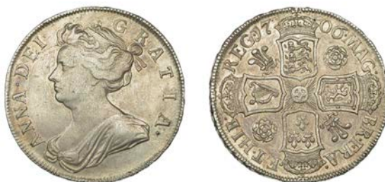
449 Halfcrown, 1706, roses and plumes, edge QUINTO (ESC 1361 [572]; S 3582). Nearly extremely fine