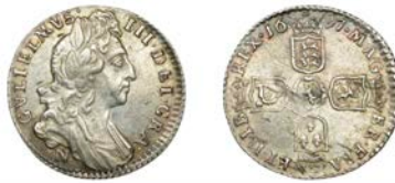
446 Sixpence, 1697 N , first bust, small crowns, later harp, unbarred H in HIB (ESC 1290 [1561]; S 3535). About extremely fine

Provenance: Spink Auction 183, 26-7 September 2006, lot 155