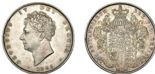
168 Halfcrown, 1825 (ESC 2371 [642]; S 3809). Tiny edge bruise at 9 o'clock on reverse, otherwise extremely fine, toned £200-£260