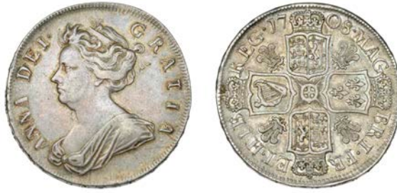
149 Halfcrown, 1708, plumes, edge SEPTIMO (ESC 1369 [578]; S 3606). Some light scratches, otherwise good very fine and toned £300-£400