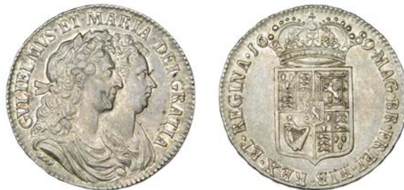
134 Halfcrown, 1689, second shield, caul only frosted, pearls, edge PRIMO (ESC 839 [510]; S 3435). Good very fine with traces of mint bloom £400-£500