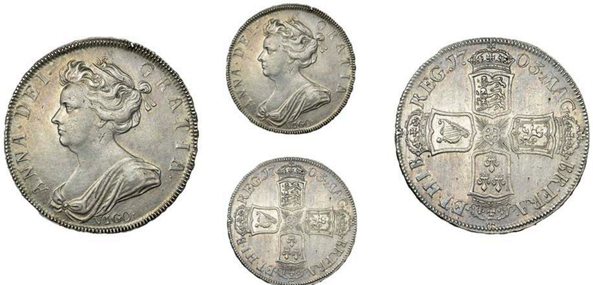
145 Halfcrown, 1703 VIGO, edge TERTIO (ESC 1358 [569]; S 3580). Has been cleaned, otherwise good very fine £300-£400