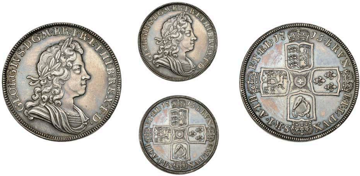
152 Pattern Halfcrown, 1715, by J. Croker, in silver, laureate bust right, rev. cruciform shields, edge plain (ESC 1549 [586]; S 3641). Cleaned at one time but now re-toned, scratched in obverse field and on edge and with some minor marks, otherwise about extremely fine, extremely rare £3,000-£4,000