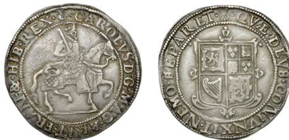
182 Charles I , First coinage, Thirty Shillings, mm. large thistle-head, 14.91g/7h (Bull 3c/L7; Murray pl. iii, 13; SCBI 35, 1412; B 2, fig. 997; S 5541). Very fine £400-£500