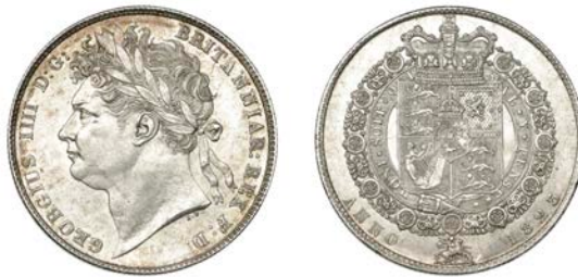
167 Halfcrown, 1823, type 2 (ESC 2365 [634]; S 3808). Extremely fine £300-£400