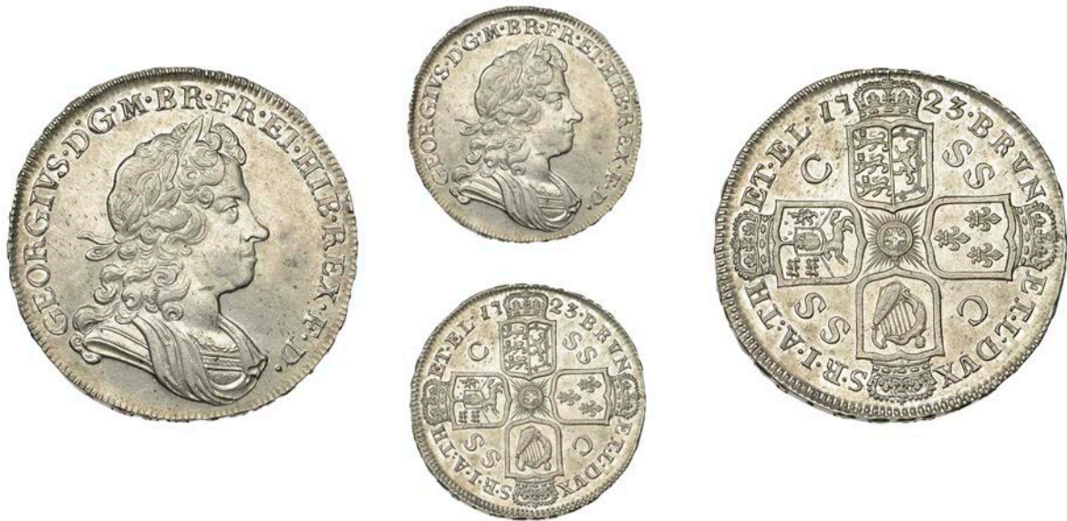
154 Halfcrown, 1723 ss c, edge DECIMO (ESC 1557 [592]; S 3643). Tiny edge bruise on obverse at 2 o'clock, otherwise extremely fine with mint bloom £2,000-£2,600