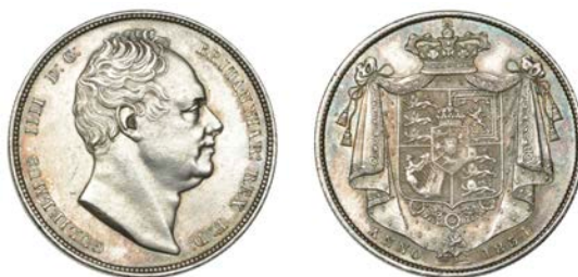
169 Halfcrown, 1834, w.w. in block letters (ESC 2474 [660]; S 3834A). A few minor marks, otherwise about extremely fine, toned £300-£400