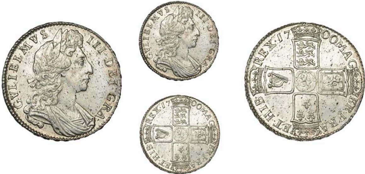
141 Halfcrown, 1700, edge DVODECIMO (ESC 1043 [561]; S 3494). Minor flecking, otherwise extremely fine with mint bloom £1,000-£1,200