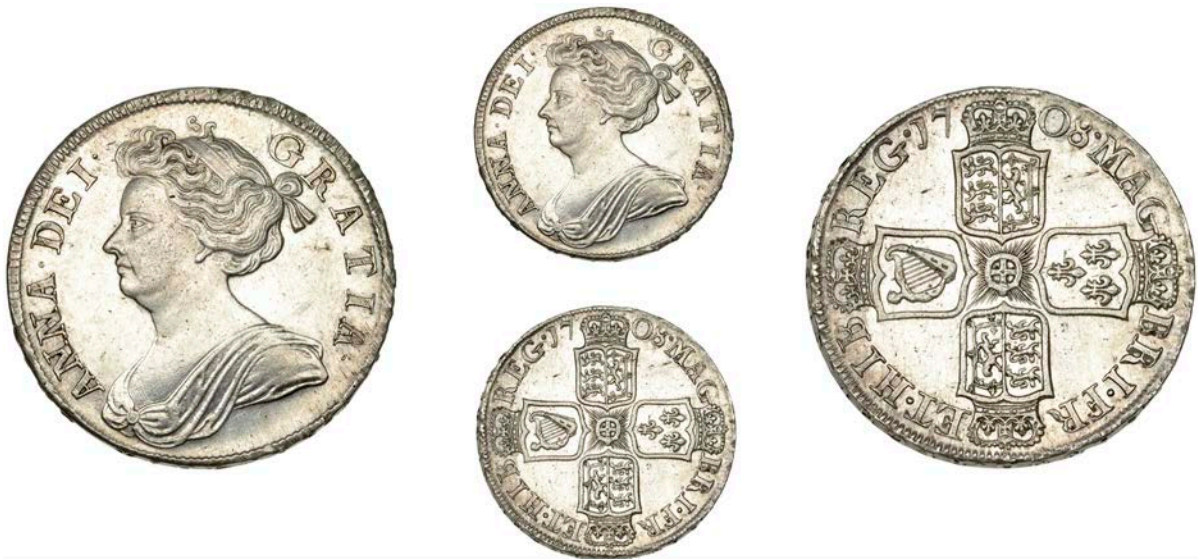
150 Halfcrown, 1708, edge SEPTIMO (ESC 1370 [577]; S 3604). Lightly cleaned, otherwise extremely fine £600-£800