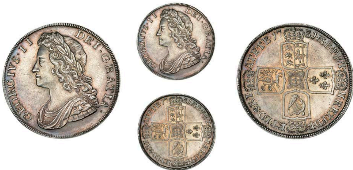
156 Pattern Halfcrown, 1731, by J. Croker, in silver, laureate bust left, rev. cruciform shields, edge plain, 15.38g/6h (ESC 1673 [594]; S 3691). Characteristic flatness on rim at date, a few minor surface marks, otherwise extremely fine and attractively toned, very rare £6,000-£8,000