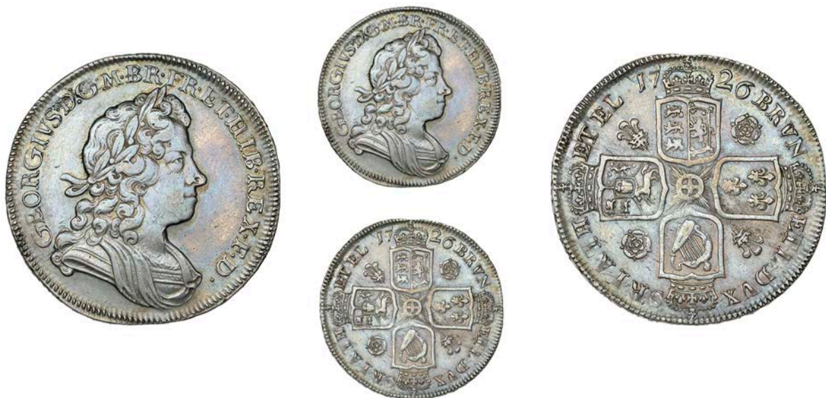
155 Halfcrown, 1726, small roses and plumes, edge DECIMO TERTIO (ESC 1559 [593]; S 3644). Good very fine and toned, extremely rare £10,000-£12,000