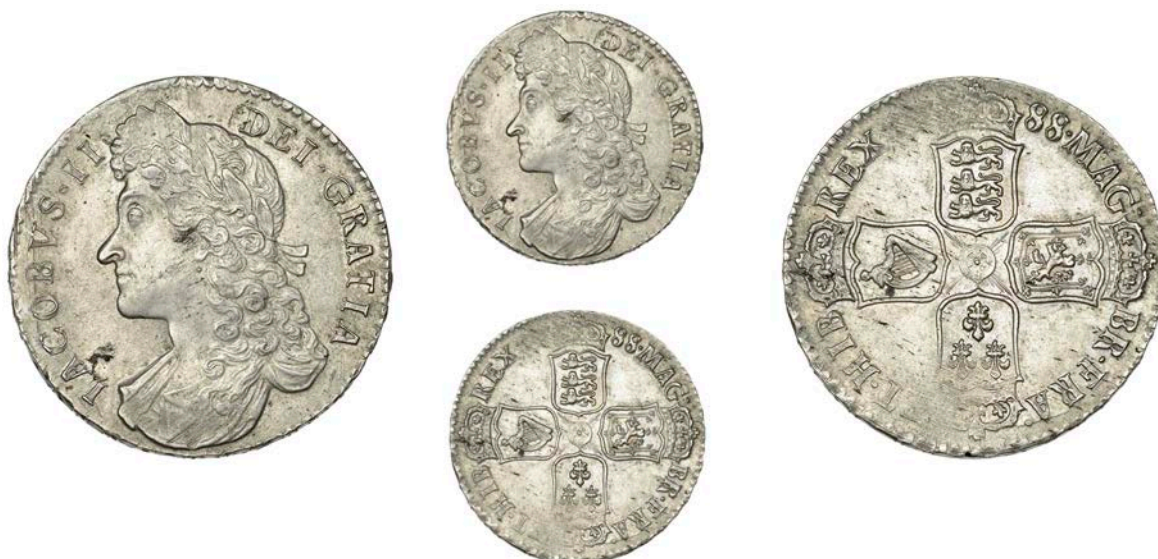
132 Halfcrown, 1688, second bust, edge QUARTO (ESC 759 [502]; S 3409). Weak in parts and minor scrapes on obverse, otherwise about extremely fine £500-£700