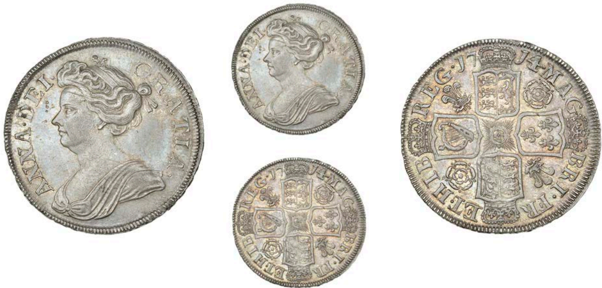
151 Halfcrown, 1714/3, roses and plumes, edge DECIMO TERTIO (ESC 1378 [585A]; S 3607). About extremely fine and toned, the overdate rare £600-£800