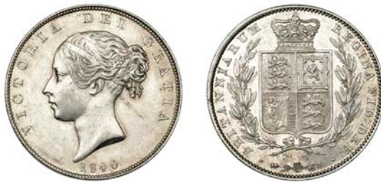
171 Halfcrown, 1840 (ESC 2715 [673]; S 3887). Some minor marks, otherwise about extremely fine £200-£260