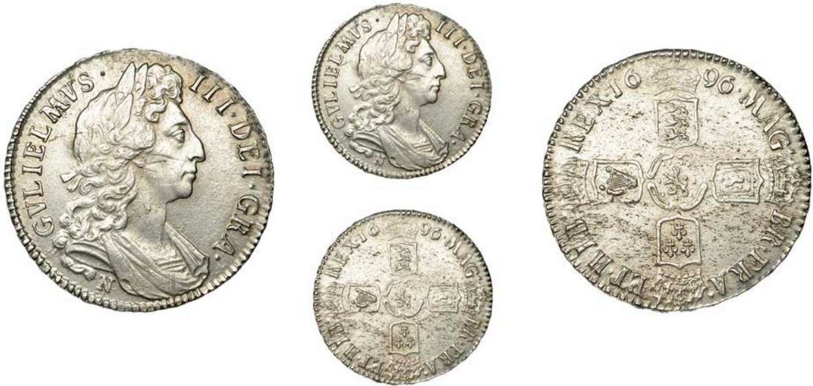
137 Halfcrown, 1696n, small shields, early harp, edge OCTAVO (ESC 1083 [538]; S 3479). Marks on bust, otherwise about extremely fine, scarce £500-£700