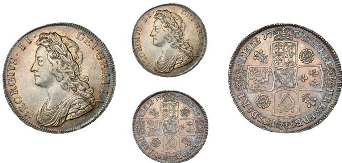
157 Halfcrown, 1732, roses and plumes, edge SEXTO (ESC 1675 [596]; S 3692). Good very fine, toned £500-£700