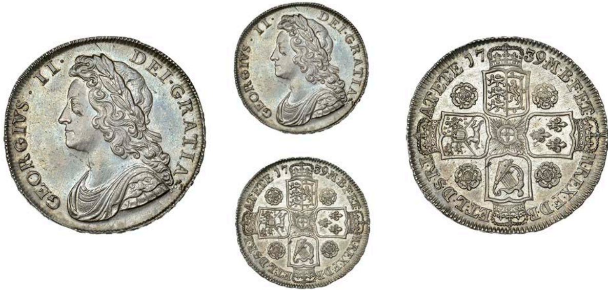
158 Halfcrown, 1739, roses, edge DVODECIMO (ESC 1679 [600]; S 3693). Extremely fine