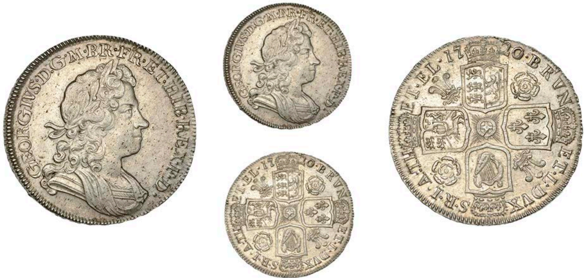
153 Halfcrown, 1720/17, roses and plumes, edge SEXTO (ESC 1555 [590]; S 3642). Minor flecking, otherwise extremely fine £1,000-£1,200