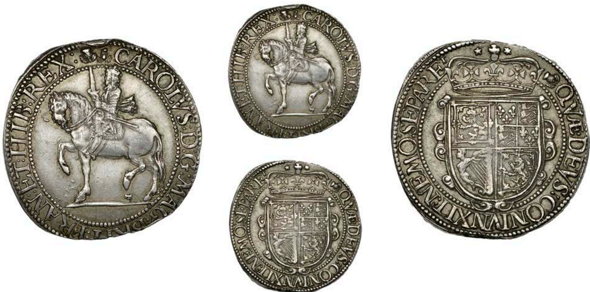
185 Charles I, Third coinage, Falconer's Second issue, Thirty Shillings, mm. two leaved thistles (large and small), F by horse's hoof, smooth ground line, two small stars above crown, 14.99g/6h (Bull 15; Murray 4; cf. SCBI 35, 1492-4; B 38; S 5555). Edge flaw at 12 o'clock, otherwise better than very fine £400-£500