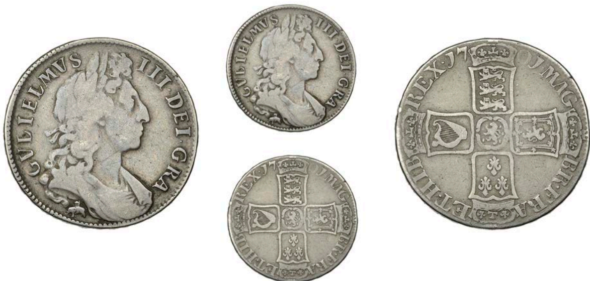
142 Halfcrown, 1701, elephant and castle, edge DECIMO TERTIO (ESC 1050 [566]; S 3495). Fine, extremely rare £1,500-£1,800