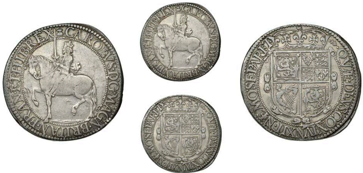
184 Charles I, Third coinage, Intermediate issue, Thirty Shillings, mm. thistle-head, 14.38g/6h (Bull 7; Murray pl. iii, 15; SCBI 35, 1457; B 20, fig. 1015; S 5554). Good fine or better £200-£260