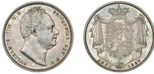
170 Halfcrown, 1836 (ESC 2482 [666]; S 3834). Hairline scratches on obverse, otherwise about extremely fine £100-£120