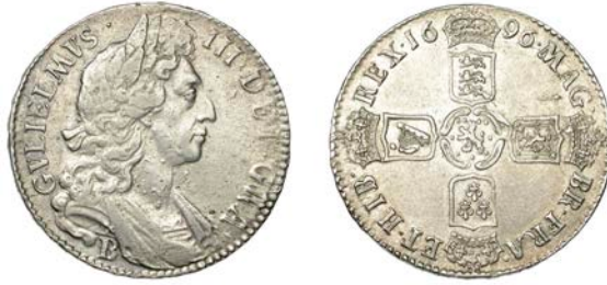
136 Halfcrown, 1696b, small shields, early harp, edge OCTAVO (ESC 1053 [535]; S 3476). Very fine, reverse better, scarce £200-£260