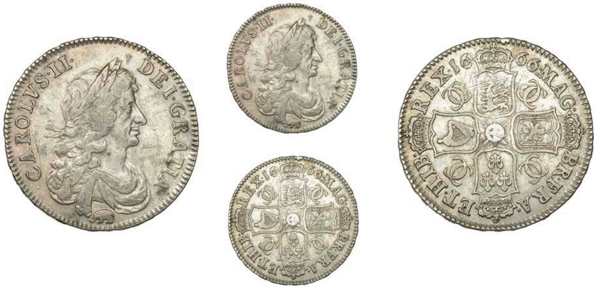
128 Halfcrown, 1666/4, third bust, elephant below, edge XVIII (ESC 447 [462]; S 3364). Small edge knock or flaw and some light scratches, otherwise very fine, very rare £1,500-£1,800