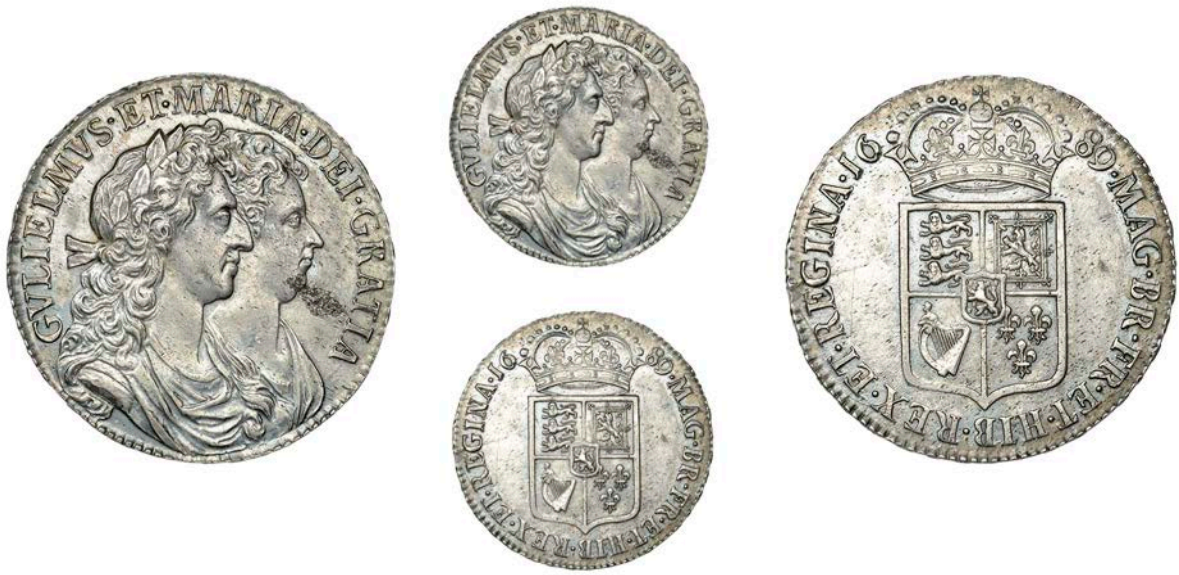
133 Halfcrown, 1689, first shield, caul and interior frosted, pearls, edge PRIMO (ESC 826 [503]; S 3434). Flan flaw on obverse, otherwise extremely fine £600-£800