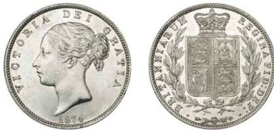
173 Halfcrown, 1874 (ESC 2741 [692]; S 3889). Lightly cleaned, otherwise extremely fine £150-£180