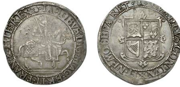
181 James VI , Tenth coinage, Thirty Shillings, mm. thistle-head, Scottish arms in first and fourth quarters, 14.75g/2h (SCBI 35, 1370-4; B 14, fig. 984; S 5504). Small digs in obverse field, otherwise about very fine, toned £200-£300