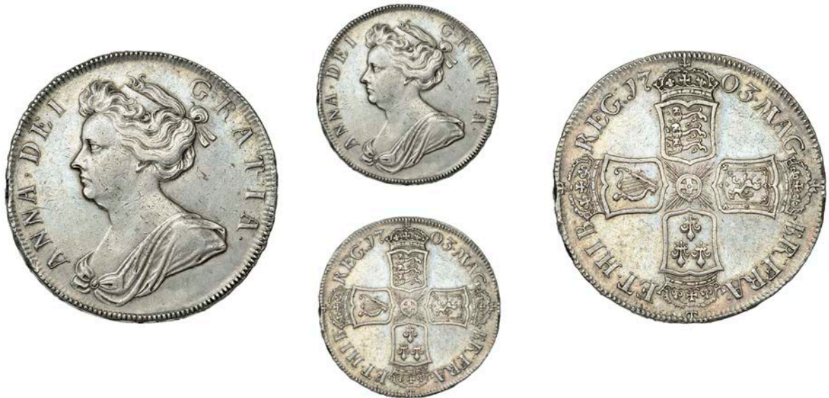
144 Halfcrown, 1703, edge TERTIO (ESC 1357 [568]; S 3579). Some contact marks, otherwise good very fine, very rare £2,000-£2,600