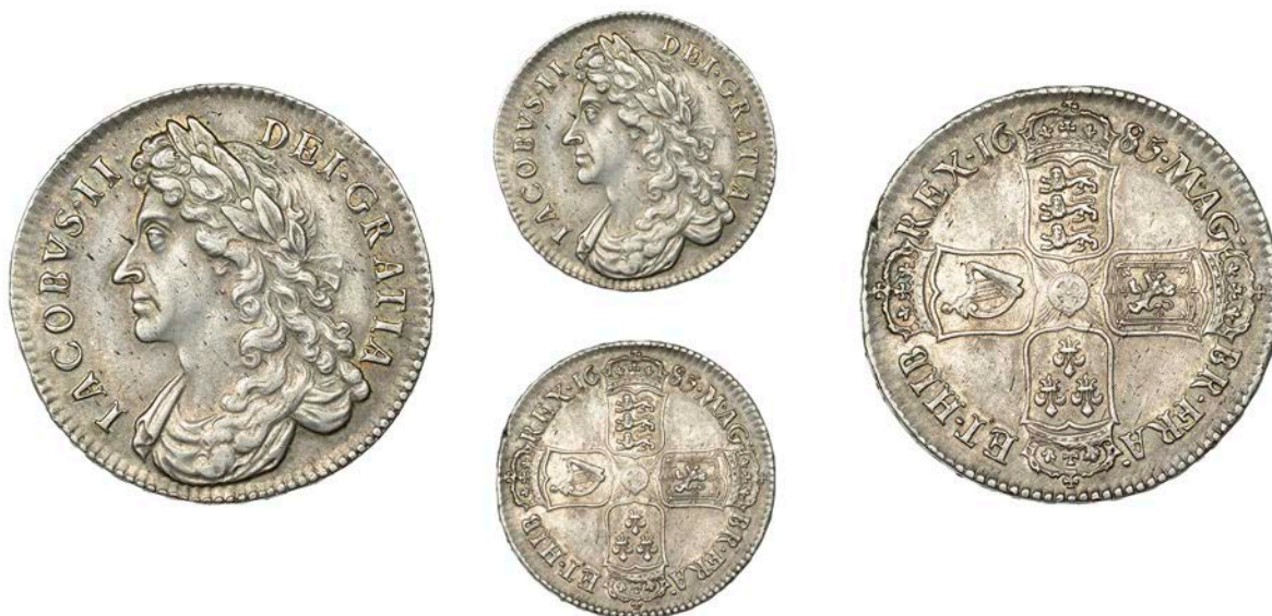
131 Halfcrown, 1685, first bust, edge PRIMO (ESC 748 [493]; S 3408). Small edge flaw and minor marks, otherwise about extremely fine £800-£1,000