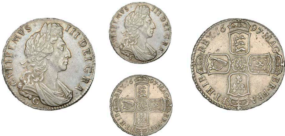
138 Halfcrown, 1697c, large shields, large late harp, edge NONO (ESC 1068 [545]; S 3489). Good very fine and toned, scarce £500-£700