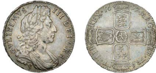
140 Halfcrown, 1697 Y , large shields, large late harp, edge NONO (ESC 1100 [551]; S 3492). Small scratch on face, otherwise very fine £150-£180