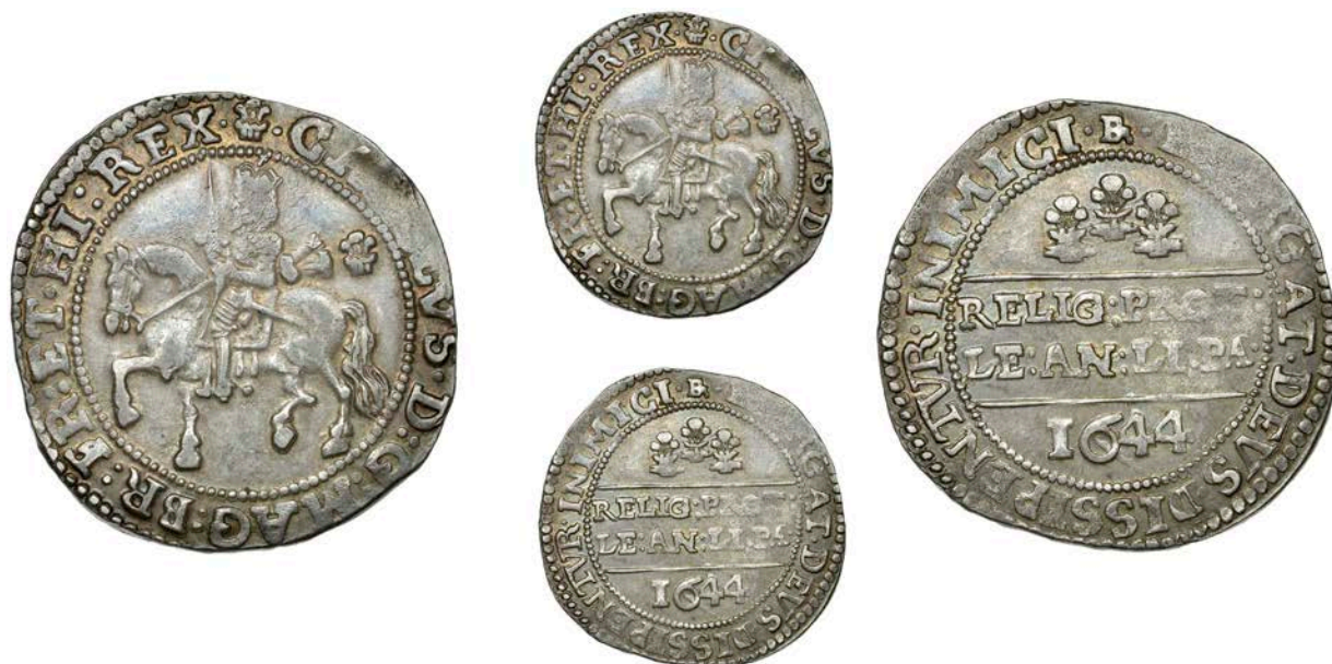
66 Halfcrown, 1644, mm. plume on obv. , Br on rev. , small Bristol plume behind horseman, three Bristol plumes above Declaration, date below, pellet at start of legend, 14.37g/9h (Bull 640/1c (D13-1a); Morr. B-1; SCBI Brooker 980A, this coin ; N 2489; S 3007). Nearly extremely fine with attractive tone £1,000-£1,200 Provenance: J.G. Brooker Collection; bt Spink. Bull lists this Brooker specimen in error under 640/1a (but note the diagonal flaw through the centre of the 6) and gives an incorrect weight of 12.83g