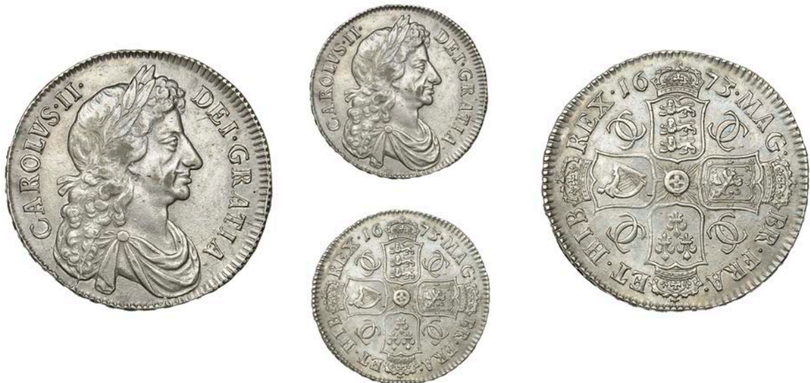
129 Halfcrown, 1673, fourth bust, edge VICESIMO QVINTO (ESC 463 [473]; S 3367). Good very fine £600-£800