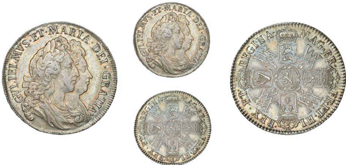
135 Halfcrown, 1693, edge QUINTO (ESC 860 [519]; S 3436). Minor wear on high points, otherwise extremely fine or better, attractively toned £2,000-£2,600