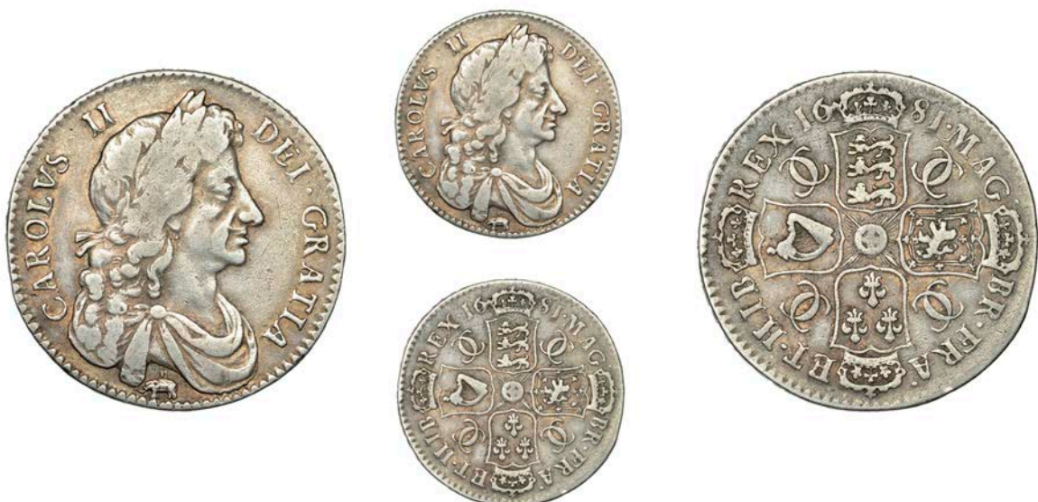
130 Halfcrown, 1681, fourth bust, elephant and castle below, edge TRICESIMO TERTIO (ESC 492 [488]; S 3370). About very fine, extremely rare £3,000-£4,000