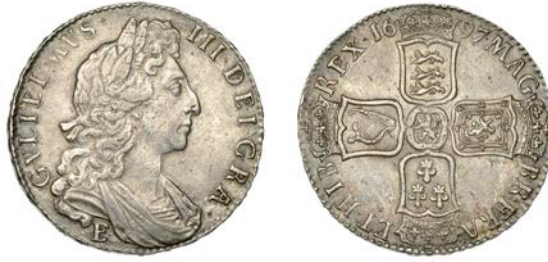
139 Halfcrown, 1697 E , large shields, large late harp, edge NONO (ESC 1077 [547]; S 3490). Good very fine £300-£400