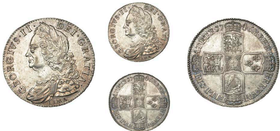
160 Halfcrown, 1746 LIMA, edge DECIMO NONO (ESC 1688 [606]; S 3695A). Extremely fine