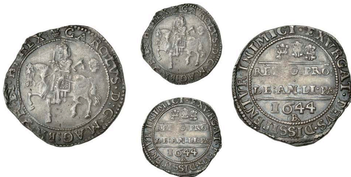
67 Halfcrown, 1644, mm. Bristol plume on obv. only, Bristol horseman, Bristol plume behind, three Bristol plumes above Declaration, date and BR monogram below, 14.34g/10h (Bull 641/4 (D21-2b), this coin ; Morr. B-4; SCBI Brooker 981; N 2490; S 3008). Good very fine and toned, but faint old scratches by King's head £700-£900 Provenance: H.M. Lingford Collection; bt Baldwin 1993