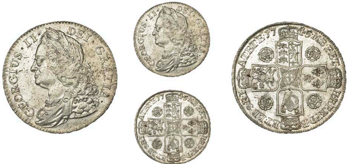
159 Halfcrown, 1745, roses, edge DECIMO NONO (ESC 1685 [604]; S 3694). Minor flecking, otherwise good extremely fine