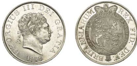
165 Halfcrown, 1818 (ESC 2099 [621]; S 3789). Some minor marks, otherwise extremely fine, proof-like surfaces £150-£180