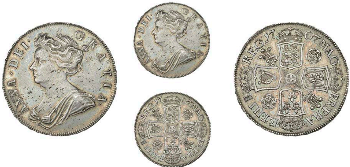
147 Halfcrown, 1707, roses and plumes, edge SEXTO (ESC 1364 [573]; S 3582). Some flecking, otherwise about extremely fine, toned £600-£800