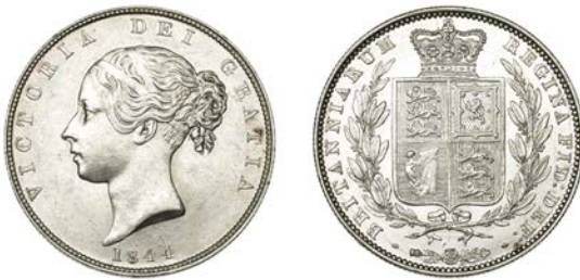
172 Halfcrown, 1844 (ESC 2720 [677]; S 3888). About extremely fine £200-£260