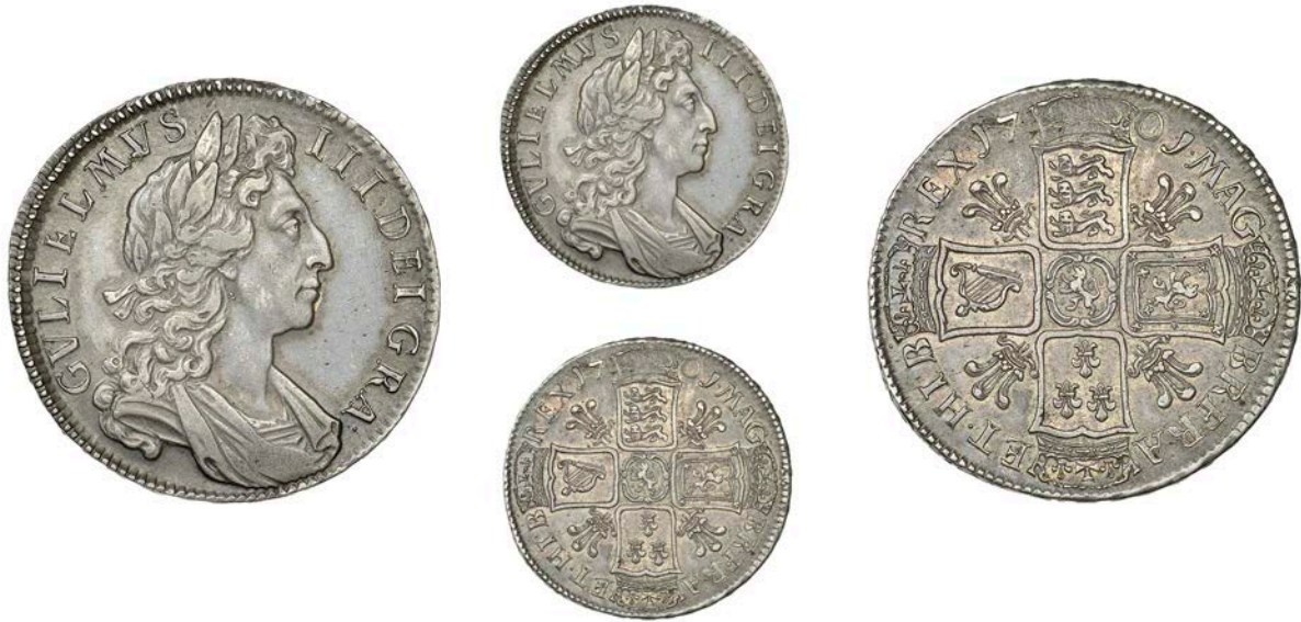
143 Halfcrown, 1701, plumes, edge DECIMO TERTIO (ESC 1052 [567]; S 3496). Lightly cleaned at one time but now re-toned, otherwise good very fine, rare £1,000-£1,200