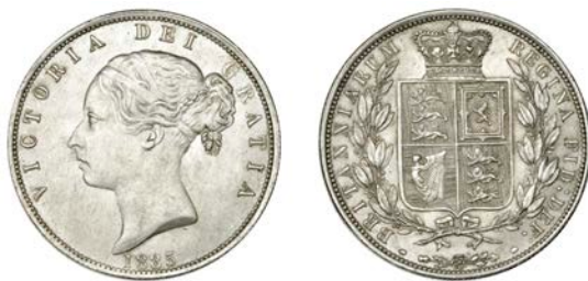
174 Halfcrown, 1885 (ESC 2765 [713]; S 3889). About extremely fine £150-£180