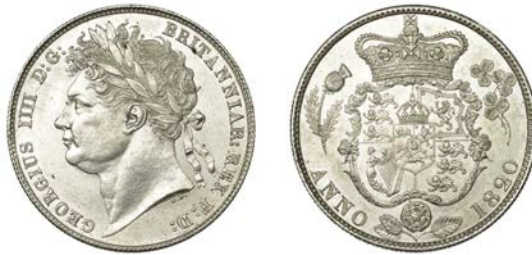
166 Halfcrown, 1820 (ESC 2357 [628]; S 3807). Extremely fine £240-£300