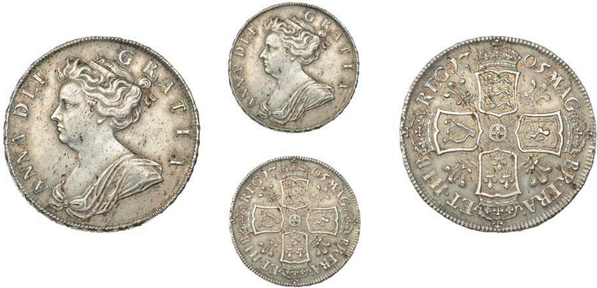
146 Halfcrown, 1705, plumes, edge QVINTO (ESC 1360 [571]; S 3581). Some flecking, otherwise about extremely fine, rare £800-£1,000