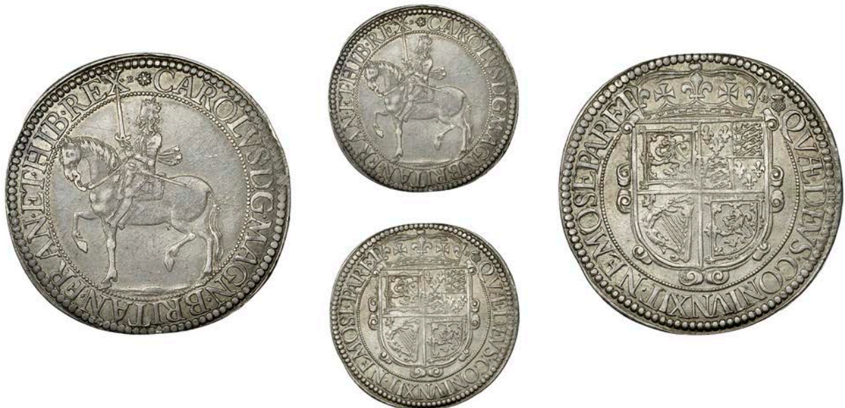
183 Charles I , Third coinage, Briot's issue, Thirty Shillings, mm. flower on obv. , thistle-head on rev. , signed v both sides, 14.81g/6h (Bull 6; Murray pl. iii, 14; SCBI 35, 1427-9; B 6, fig. 1006; S 5553). Good very fine, grey tone £400-£500