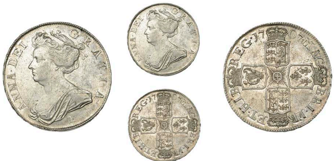
148 Halfcrown, 1707E, edge SEXTO (ESC 1379 [575]; S 3605). Some contact marks, otherwise extremely fine £400-£500