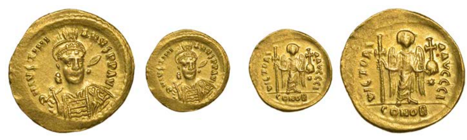
110 Justinian I , Solidus, Constantinople, helmeted bust facing three-quarters right, holding spear and shield, rev. angel standing facing, holding long cross and globus cruciger, star in right field, officina 1, 4.47g (Sear 137). Light graffiti on reverse, otherwise good very fine £200-£260