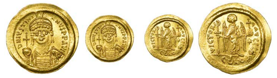
111 Justinian I , Solidus, Constantinople, helmeted bust facing, holding globus cruciger and shield, rev. angel standing facing, holding staff and globus cruciger, star in right field, officina H, 4.48g (Sear 140). Very slightly creased, otherwise extremely fine £240-£300