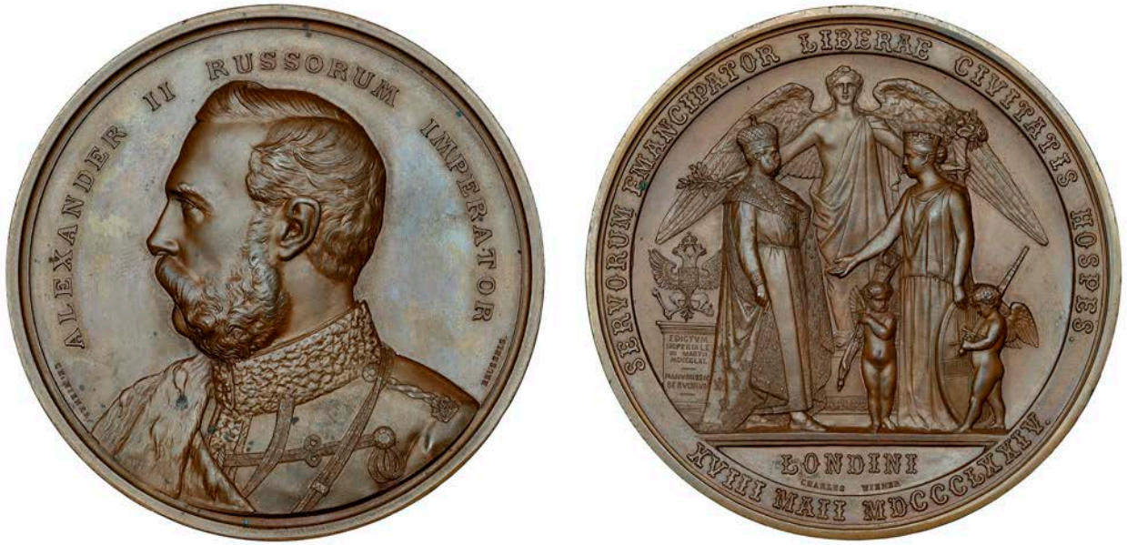
636 Visit of Alexander II to London, 1874, a bronze medal by C. Wiener for the Corporation of the City of London, bust left, rev. Londinia welcoming the Czar, Peace standing behind, 77mm (Diakov 807.1; W & E 1225.1; BHM 2981; E 1634). Extremely fine; in maroon leather gilt-blocked case of issue £500-£700