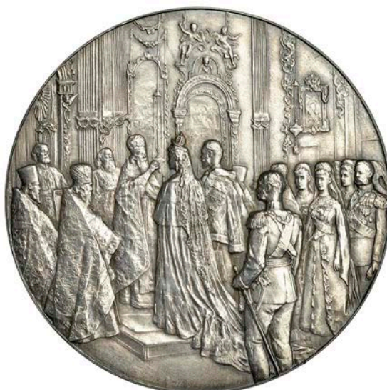
610 Marriage of Nicholas II and Alexandra, 1894 , a silver medal by A. Vasyutinsky, conjoined busts left, въ память БРАКОСОЧЕТАНІЯ ИМПЕРАТОРА НИКОЛАЯ ІІ СЪ ПРИНЦЕССОЮ АЛКСОНДРОУ ГЕССЕНСКОЮ, 14 НОЯБРЯ 1894 in left field, rev. wedding ceremony, 71mm, 182.17g (Diakov 1164.1). Lightly polished, otherwise about extremely fine, scarce £900-£1,200