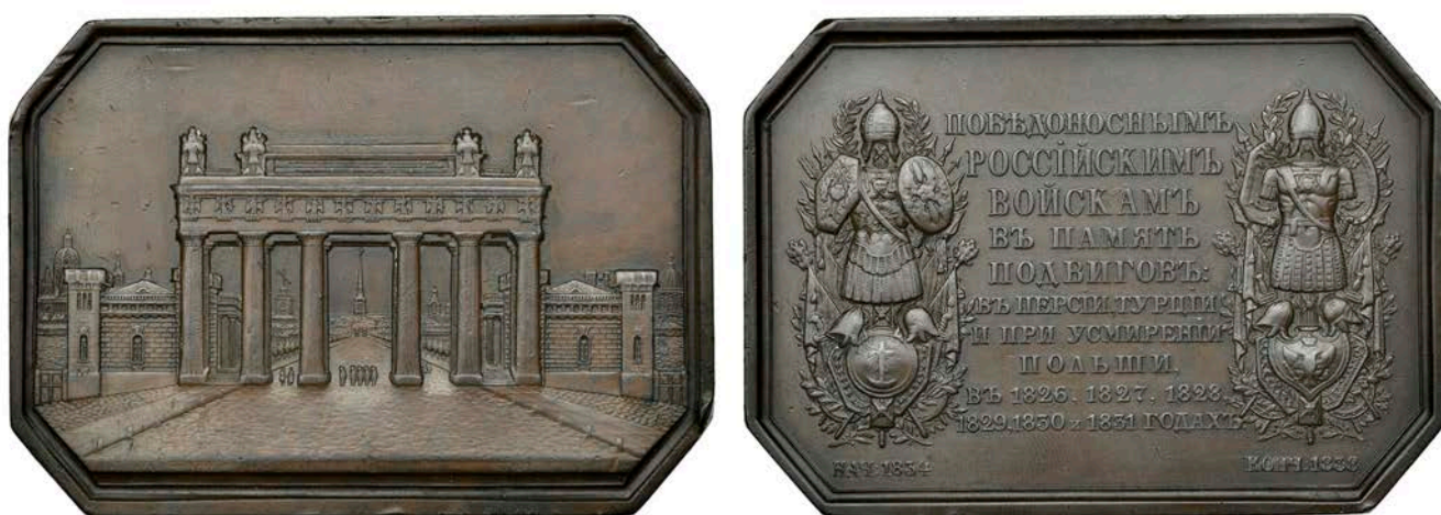
592 Opening of the Moscow Triumphal Arch, St Petersburg , 1838, a bronze plaque by H. Gube, view of the arch, rev. legend between two groups of arms, 83 x 59mm (Diakov 541.1; BDM II, 334). Faint graffiti on reverse, otherwise very fine, rare £300-£400