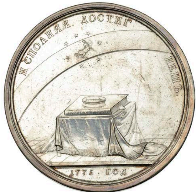
560 Establishment of Provinces, 1775 , a silver medal by T. Ivanov and P. Bobrovshikov, struck in 1790, crowned and laureate bust right, Б М ЕКАТЕРИНА II ИМПЕРАТ И САМОДЕРЖ ВСЕРОСС, rev. И СПОЛНЯЯ ДОСТИГ НЕШЬ, compass and book on draped table, Sagittarius within ring of stars above, 1775 год in exergue, 79mm, 166.82g (Diakov 169.2). Lightly polished and some contact marks, otherwise good very fine, very rare £2,000-£2,600