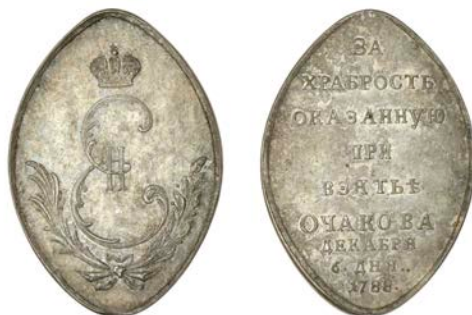
568 Capture of Fort Ochakov, 1788 , an oval silver medal, unsigned, crowned cypher within wreath, rev. ЗА ХРАБРОСТЬ ОКАЗАННУЮ ПРИ ВЪЯТЬ ОЧАКОВА ДЕКАБРЯ 6 ДНЯ 1788 in nine lines, 40 x 28mm, 6.86g (Diakov 210.2). Minor discolouration, otherwise extremely fine and very rare £900-£1,200