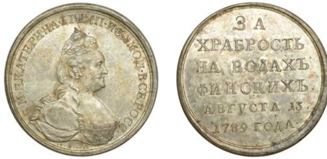
569 First Battle of Rochensalm, 1789 , a novodel silver medal by T. Ivanov, crowned bust right, б м ЕКАТЕРИНА II ИМП ИСАМОД ВСЕРОСС, rev. ЗА ХРАБРОСТЬ НА ВОДАХЪ ФИНСКИХЪ АВГУСТА 13 1789 ГОДА in six lines, 40mm, 17.71g (Diakov 217.2; Bit. M1346). Extremely fine and toned, rare £900-£1,200