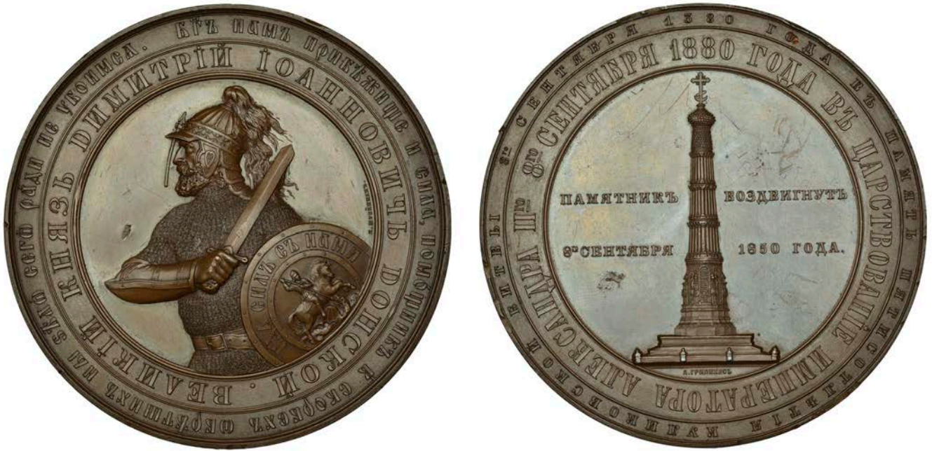
605 Quincentenary of the Battle of Kulikovo, 1880, a bronze medal by L. Shteinman and A. Griliches, half-length helmeted and armoured figure of Grand Duke Dmitry Donskoy left, holding sword and shield, rev. view of the monument commemorating the battle, 92mm (Diakov 877.1). Minor digs, scratches and edge knocks, otherwise extremely fine, very rare £500-£700