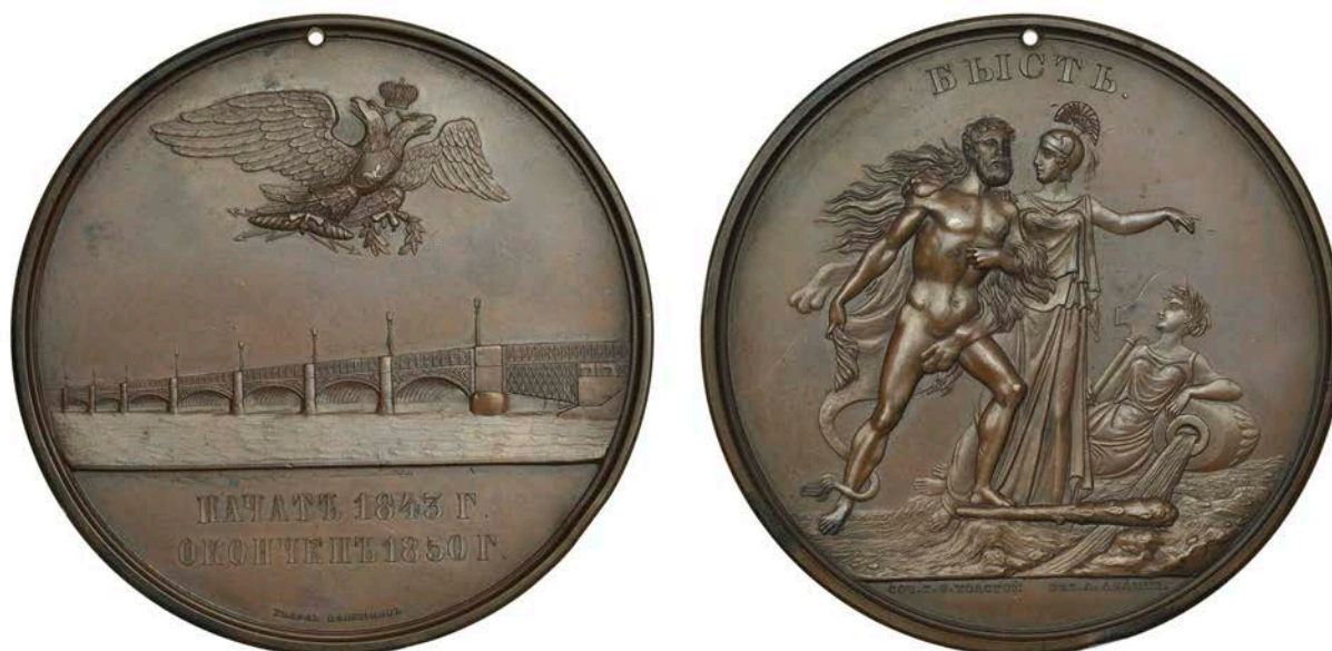
596 Completion of the Blagoveschensk Bridge, 1850 , a copper medal by A. Klepikov and A. Lyalin, view of the bridge, imperial eagle flying above, rev. Hercules and Minerva crossing a waterfall, female figure to right reclining on urn, 75mm (Diakov 594.1). Small piercing at top, otherwise about extremely fine £90-£120