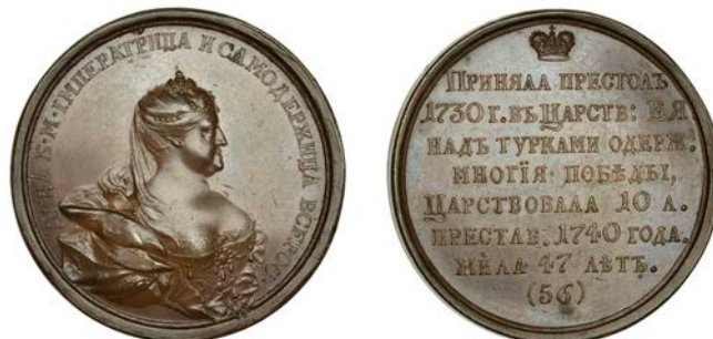
627 Anna Ioannovna , a copper medal, struck c. 1770, unsigned, crowned and mantled bust right, rev. crown above legend in 8 lines, 39mm (Diakov 1659). Minor spotting, otherwise extremely fine, patinated £100-£150

Diakov illustrates an example of the copper medal where the relief is shallower and there is no signature on the truncation. Confusion with the signature caused Forrer, who read it as G.W., to attribute the medal to Waechter's younger brother Georg Christian (BDM VI, 338). There is only a single contemporary medal of Catherine known, that for the accession to the throne, by Rastrelli