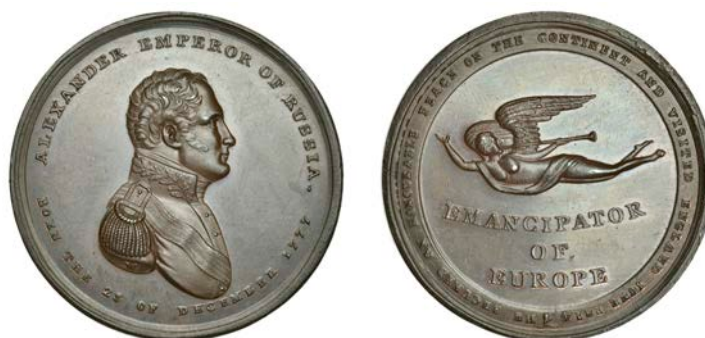
584 Visit of Alexander I to England , 1814, a copper medal by J. Westwood, uniformed bust right, rev. winged figure flying left, blowing trumpet, 43mm (Diakov 384.3; BHM 849). Extremely fine and very rare £300-£400