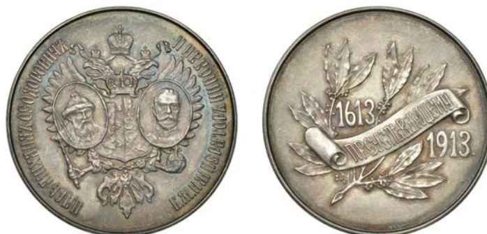
615 Tercentenary of the Romanov Dynasty , 1913, a silver medal, unsigned [by P. Stadnitsky], imperial eagle holding ovals containing busts of Mikhail Fedorovich and Nicholas II, rev. inscription on ribbon, laurel branch behind, 43mm, 26.09g (Diakov 1550.1 var.). About extremely fine, toned £300-£400 Provenance: Bt Spink 1965