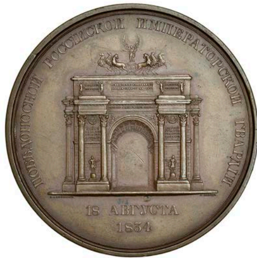
588 Re-Opening of the Narva Triumphal Arch, 1834 , a copper medal by H. Gube, A. Klepikov and A. Lyalin, radiant all-seeing eye, rev. view of the arch, 65mm (Diakov 509.1). Small edge flaw, otherwise about extremely fine £150-£200