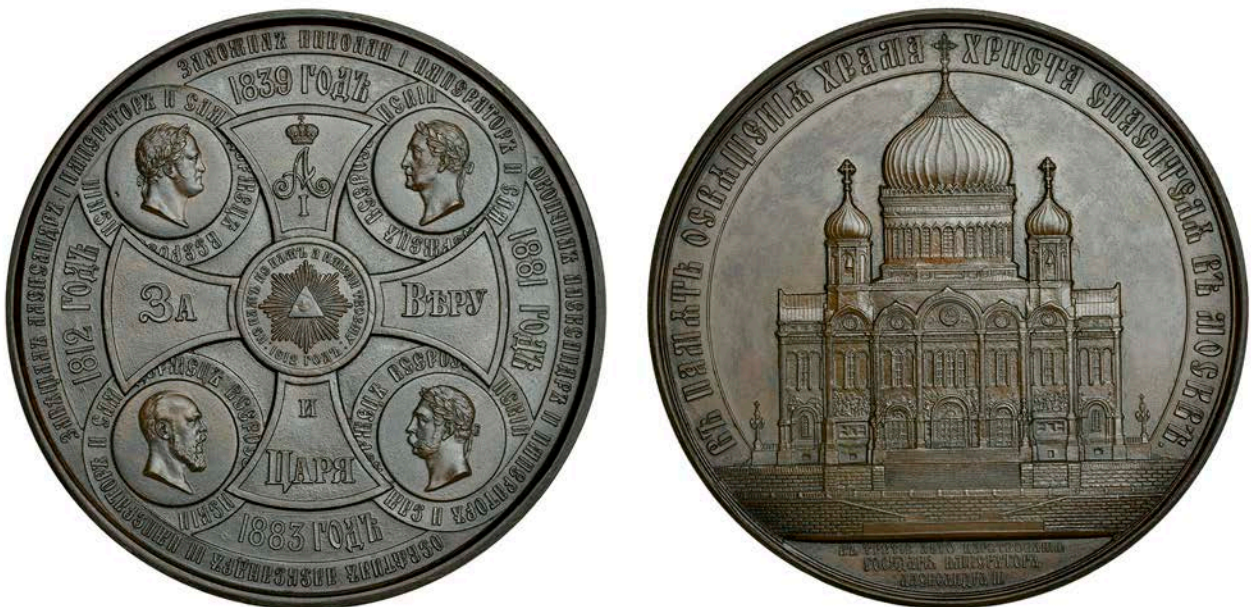
606 Consecration of the Cathedral of Christ the Saviour, 1883, a bronze medal, unsigned [by V. Alexeev], cross with roundels in angles containing heads of Alexander I, Nicholas I, Alexander II, and Alexander III, rev. view of the Cathedral, 78mm (Diakov 936.1). Lightly cleaned, otherwise extremely fine £300-£400