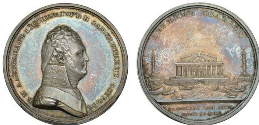
581 Foundation of the St Petersburg Bourse , 1805, a silver medal by C. Leberecht, uniformed bust right, Б М АЛЕКСАНДРЪ I ИМПЕРАТОРЪ И САМОДЕРЖЕЦЪ ВСЕРОССЪ, rev. ДВИЖИМЪ ПОЛЪЗЮ, Bourse building between two lighthouses, boats on river in foreground, заложена 1805 лѣта юня 23 дня in exergue, 52mm, 50.60g (Diakov 297.1; BDM III, 354). Some minor marks, otherwise about extremely fine, attractively toned £1,500-£2,000