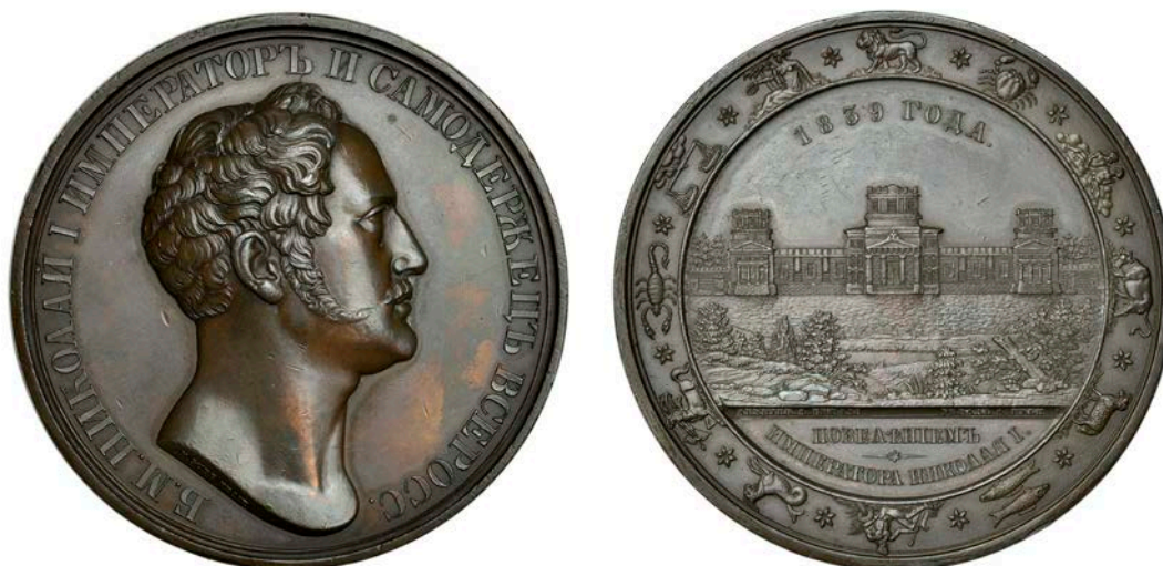
593 Opening of Pulkovo Observatory , 1839, a copper medal by H. Gube, bust right, rev. view of the Observatory, twelve signs of the Zodiac around, 66mm (Diakov 548.1). Lightly cleaned and some minor marks, otherwise about extremely fine £90-£120