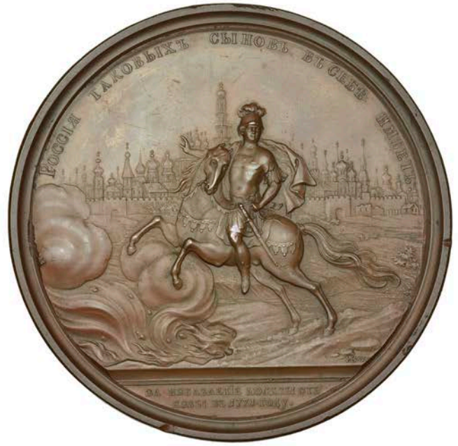
559 Count Grigory Grigorievich Orlov, 1771 , a copper medal by G.C. and J.G. Waechter, similar, 92mm (Diakov 155.1; BDM VI, 339). Extremely fine, rare £400-£500