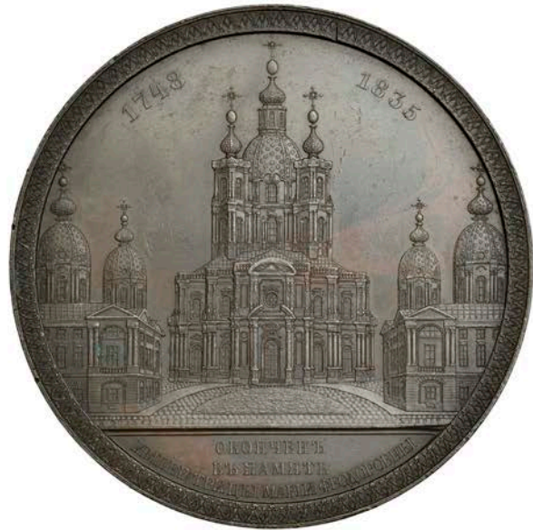
589 Consecration of Smolny Cathedral, 1835 , a copper medal by H. Gube, Christ seated facing surrounded by three children, rev. view of the cathedral, 75mm (Diakov 515.1). Lightly cleaned and some contact marks, otherwise about extremely fine £200-£260