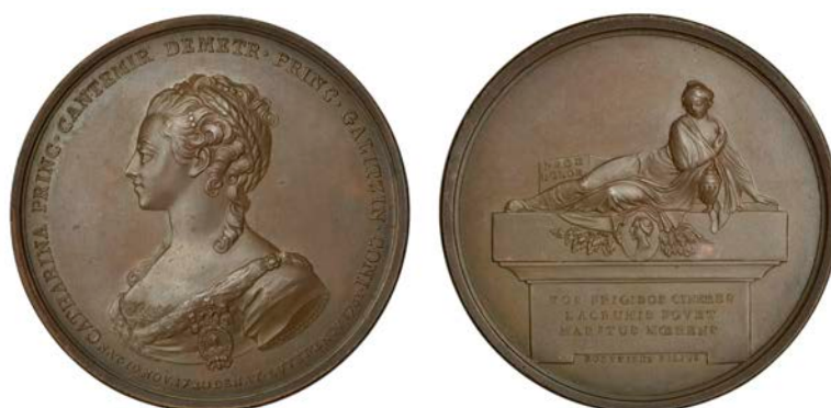
549 Death of Princess Catherine Galitsina, 1761, a copper medal by J. Roettiers, diademed bust left, rev. grieving woman lying on tombstone, 46mm (Diakov 108.1). Fields lightly brushed, otherwise extremely fine, rare £200-£260