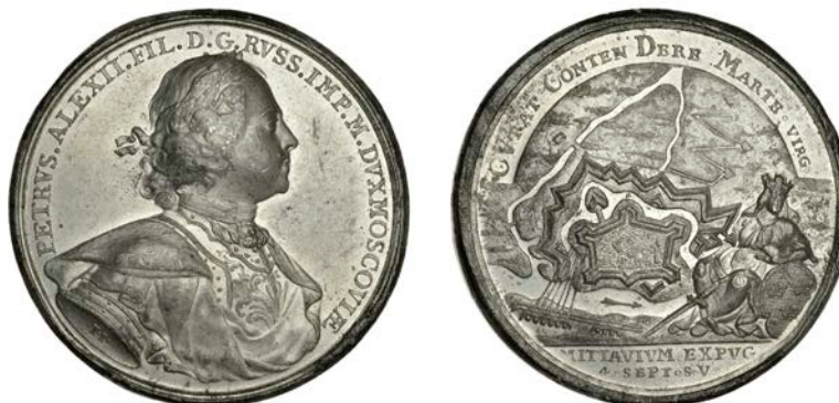
542 Capture of Mitau, 1705 , a white metal medal by T. Ivanov, date in chronogram, laureate and armoured bust right, rev. crowned female figure seated left, leaning on shield bearing Swedish arms, plan of Mitau in background, 46mm (Diakov 23.6; BDM III, 39). About extremely fine, scarce £90-£120