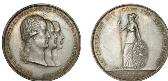
582 Triple Alliance , 1813, a silver medal by K. Lesser, conjoined busts of Franz II of Austria, Alexander I of Russia and Friedrich Wilhelm III of Prussia right, rev. Pallas standing left, holding spear and shield, 40mm, 19.67g (Diakov 365.2; Bramsen 1251). Some minor marks, otherwise about extremely fine and toned, rare £800-£1,000