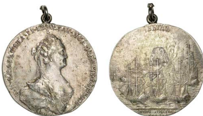
557 Battle of Chesme , 1770, a silver medal by T. Ivanov and S. Yudin, crowned bust right, б м ЕКАТЕРИНА II ИМПЕРАТ И САМОДЕРЖ ВСЕРОСС, rev. БЫЛЪ, four Russian ships in foreground, Turkish ships in flames in background, ЧЕСМЕ 1770 ГОДА ЮЛЯ 24 Д in exergue, 39mm, 24.50g (Diakov 147.1; Bit. M1300). Traces of gilding and some metal flaws, otherwise very fine, rare; with loop and ring for suspension £2,000-£2,600