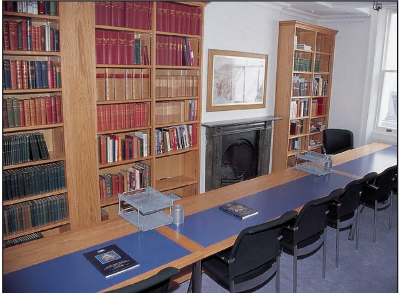
Auction viewing room

In addition, we handle discreet private treaty sales of fine orders, decorations and medals.