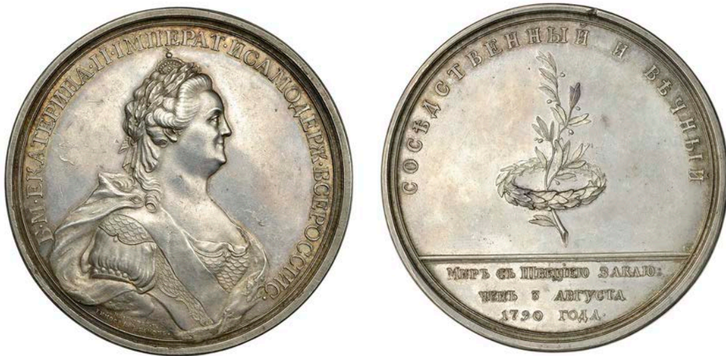
570 Peace with Sweden, 1790 , a silver medal by T. Ivanov and P.W. Gass, crowned bust right, б м ЕКАТЕРИНА II ИМПЕРАТ И САМОДЕРЖ ВСЕРОССИЙС, rev. СОСЪДСТВЕННЫЙ И ВЪЧНЫЙ, olive branch within wreath, МИРЪ СЪ ШВЕЦІЕЮ ЗАКЛЮ ЧЕНЪ 3 АВГУСТА 1790 ГОДА in exergue, 66mm, 100.73g (Diakov 221.3 var.). Small flaw on reverse rim, otherwise about extremely fine and toned, very rare £1,500-£2,000 The legend below the bust differs from that described by Diakov; it is dated 1789 instead of 1790