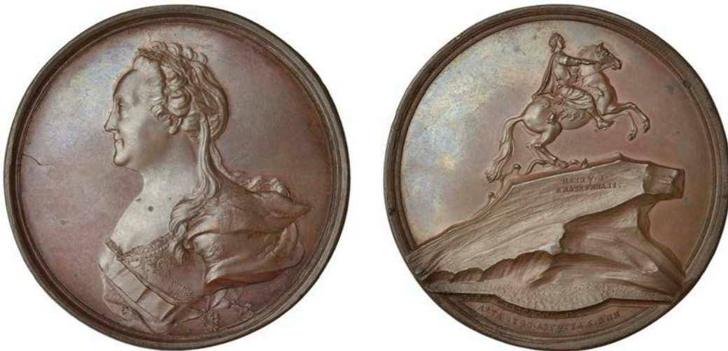
563 Unveiling of the Peter I Monument, St Petersburg, 1782 , a copper medal by C. Leberecht, laureate bust left, rev. view of the monument, 65mm (Diakov 194.5; BDM III, 354). Extremely fine and very rare £400-£500