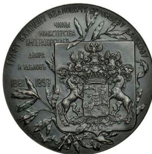
612 Count Ilarion Ivanovich Vorontsov-Dashkov, 1897 , a bronze medal by A. Vasyutinsky, uniformed bust left, rev. shield of arms, laurel branch behind, 68mm (Diakov 1245.1). Brushed and a small scrape behind head, otherwise about extremely fine £90-£120