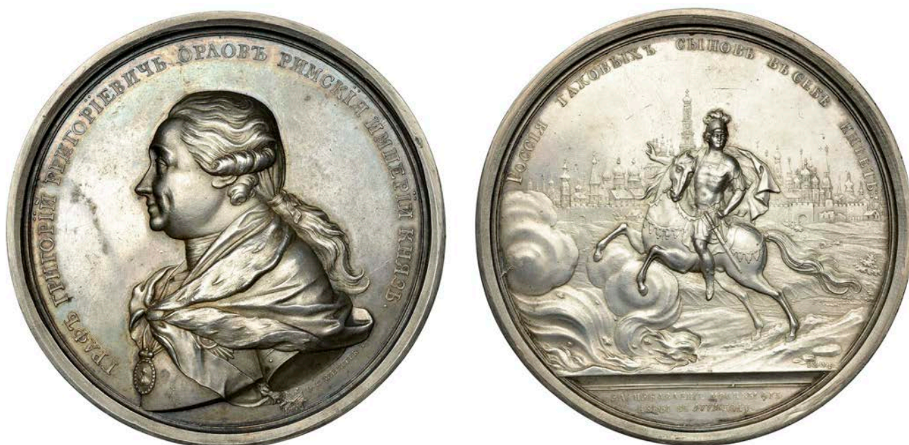
558 Count Grigory Grigorievich Orlov , 1771, a silver medal by G.C. and J.G. Waechter, uniformed bust left, ГРАФЪ ГРИГОРІЙ ГРИГОРІЕВИЧЪ ОРОЛОВЪ РИМСКІЯ ИМПЕРІИ КНЯЗЬ, rev. РОССІЯ ТАКОВЫХЪ СЫНОВЪ ВЪ СЕБѢ ИМѢЕТЪ, Count Orlov on horseback left, view of Moscow in background, ЗА ИЗБАВЛЕНІЕ МОСКВЫ ОТЬ ЯЗВЫ ВЪ 1771 ГОДУ in exergue, 92mm, 307.11g (Diakov 155.1; BDM VI, 339). Fields lightly brushed, otherwise extremely fine and extremely rare £9,000-£12,000