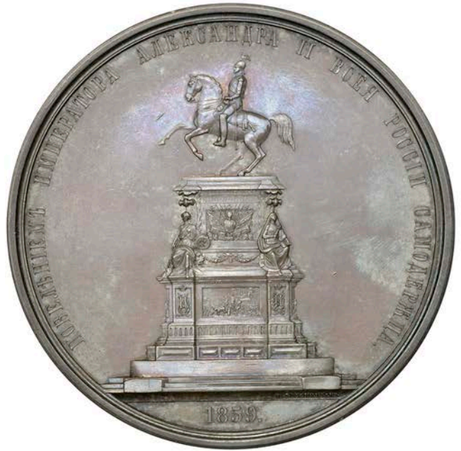
600 Unveiling of the Nicholas I Monument, St Petersburg, 1859 , a silver medal by P. Brusnitsyn, helmeted and armoured bust of Nicholas I left, НИКОЛАЙ I ИМПЕРАТОРЪ II САМОДЕРЖЕЦЪ ВСЕРОССИЙСКИЙ, РОДИЛСЯ 25 ЮНЯ 1796 ГОДА, СКОНЧ 18 ФЕВРАЛЯ 1855 Г., rev. ПОВЕЛЕНИЕМЪ ИМПЕРАТОРА АЛЕКСАНДРА II ВСЕЙ РОССИИ САМОДЕРЖЦА, view of the monument, 87mm, 254.69g (Diakov 681.1). Lightly polished, otherwise about extremely fine and toned, rare £2,000-£2,600