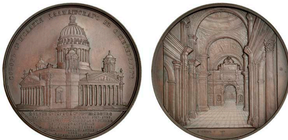
599 Consecration of St Isaac's Cathedral , 1858, a copper medal by J. Wiener, exterior of the Cathedral, rev. interior of the Cathedral, 60mm (Diakov 677.4; BDM VI, 487). Extremely fine £200-£260