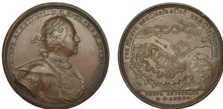
541 Capture of Narva, 1704 , a copper medal by T. Ivanov, date in chronogram, laureate and armoured bust right, rev. topographical view of Narva, 47mm (Diakov 21.18; BDM III, 39). About extremely fine £150-£180