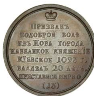
617 Svyatopolk II (1093-1113) , a copper medal, struck c. 1770, unsigned, helmeted bust facing, rev. legend in eight lines, small crown above , 39mm (Diakov 1616.3). Lightly cleaned, otherwise extremely fine, scarce £90-£120 No. 13 in the portrait series of Russian Grand Dukes and Tsars