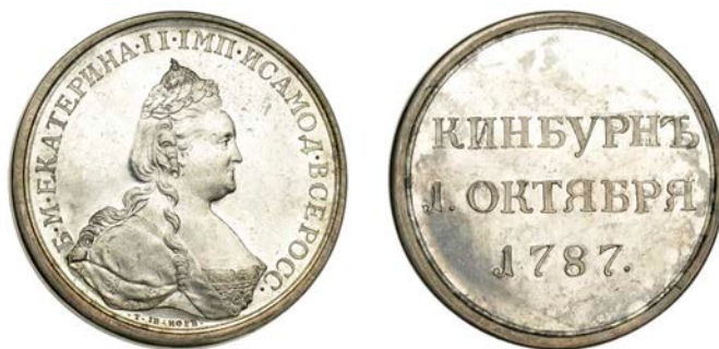
565 Battle of Kinburn, 1787 , a novodel silver medal by T. Ivanov, crowned bust right, Б М ЕКАТЕРИНА II ИМП ИСАМОД ВСЕРОСС, rev. КИНБУРНЪ 1 ОКТЯБРЯ 1787 in three lines, 40mm, 19.21g (Diakov 206.1; Bit. M1331). Extremely fine and brilliant, extremely rare £2,000-£2,600