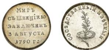
571 Peace with Sweden, 1790 , a novodel silver jeton, unsigned, legend in five lines, rev. olive branch within laurel wreath, edge plain, 22mm, 4.27g (Diakov 221.6 var.; Bit. 1393). Brilliant mint state, rare £400-£500