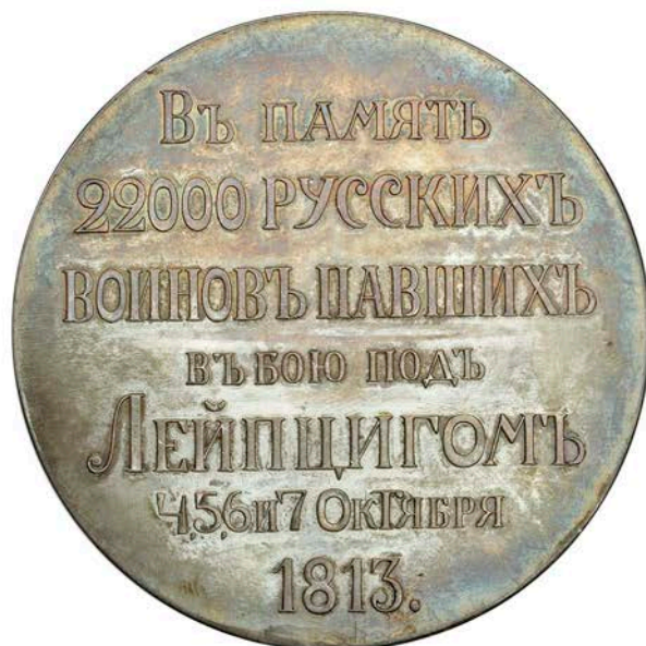
616 Centenary of the Battle of Leipzig, 1913 , a silver medal, unsigned, issued by Klebnikov & Sons, chapel, НЕ НАМЪ НЕ НАМЪ А ИМЕНИ ТВОЕМУ , date in exergue, rev. въ память 22000 РУССКИХЪ ВОИНОВЪ ПАВШИХЪ ВЪ БОЮ ПОДЪ ЛЕЙПЦИГОМЪ 4 5 6 и 7 ОКТЯБРЯ 1813 in seven lines, 76mm, 197.03g (Diakov 1554.1 var.). Polished, otherwise good very fine, very rare £2,000-£2,600