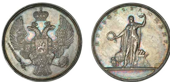
591 Male Gymnasia , a silver award medal, undated [1835], unsigned, imperial eagle, rev. Minerva standing, holding wreath and lamp, 42mm, 25.47g (Diakov 523.3). Some contact marks, otherwise very fine and toned £150-£200