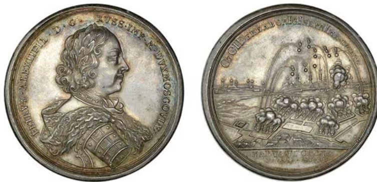
540 Capture of Narva, 1704 , a silver medal by I. Konstantinov, date in chronogram, uniformed laureate bust of Peter I right, PETRVS ALEXIIFIL D G RVSS IMP M DVX MOSCOVITAE , rev. CECIDERE AB ORIGINE PRIMA LV CERT , view of the bombardment, NARVA VI CAPTA 9 AVG ST v in exergue, edge plain, 47mm, 53.76g (Diakov 21.10). Extremely fine and toned, very rare £3,000-£4,000