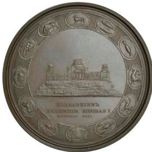
590 Breaking of Ground on Pulkovo Observatory, 1835 , a copper medal by H. Gube and A. Lyalin, bust left, rev. view of the Observatory, twelve signs of the Zodiac around, 65mm (Diakov 519 var.). Lightly brushed and a carbon spot in obverse field, otherwise extremely fine, rare £300-£400