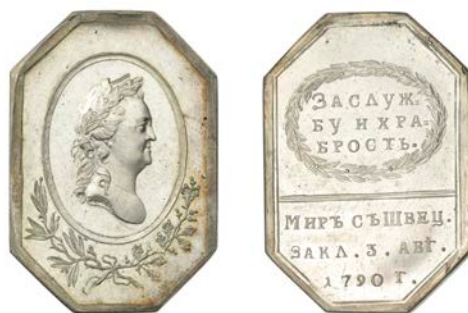
572 Peace with Sweden, 1790 , an octagonal silver medal by C. Leberecht, laureate bust within oval frame, wreath below, rev. ЗА СЛУЖБУ И ХРАБРОСТЬ within wreath, МИРЪ СЪ ШВЕЦ ЗАКЛ 3 АВГ 1790 г in exergue, 39 x 27mm, 14.32g (Diakov 221.8). Extremely fine and brilliant, very rare £900-£1,200