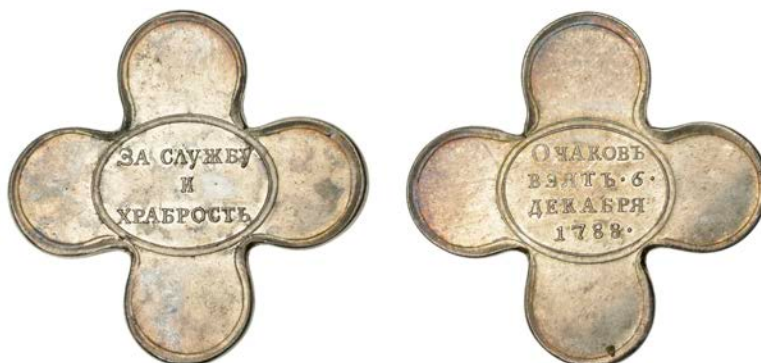
567 Capture of Fort Ochakov, 1788 , a silver medal, unsigned, за службу и храбрость within oval, rev. очаковъ взятъ 6 декабря 1788 within oval, 46 x 46mm, 17.29g (Diakov 210.1). Extremely fine and extremely rare £900-£1,200