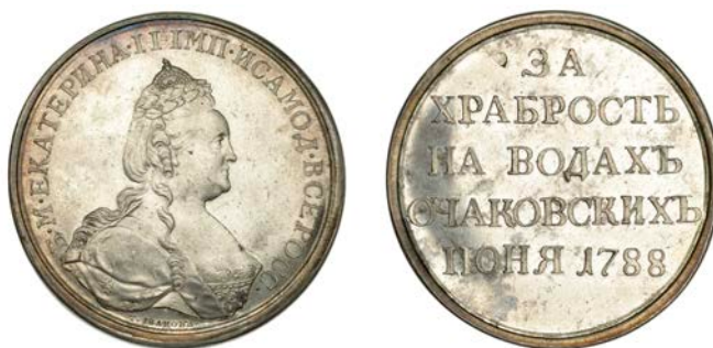
566 Naval Battle of Ochakov, 1788 , a novodel silver medal by T. Ivanov, crowned bust right, Б М ЕКАТЕРИНА II ИМП ИСАМОД ВСЕРОСС, rev. ЗА ХРАБРОСТЬ НА ВОДАХЪ ОЧАКОВСКИХЪ ЮНЯ 1788 in five lines, 40mm, 15.42g (Diakov 209.2; Bit. M1338). Overstruck with traces of undertype visible, extremely fine and very rare £1,500-£2,000