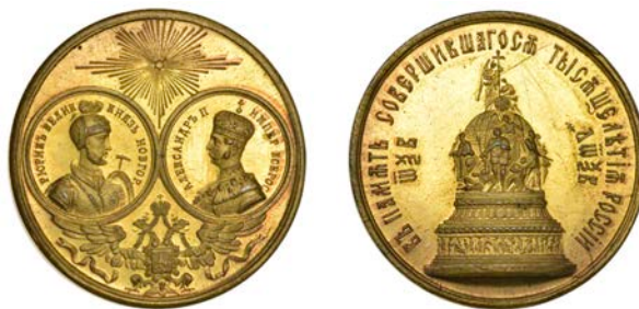
603 Unveiling of the Monument for the Millennium of the Russian State, Novgorod, 1862, a gilt-bronze medal, unsigned [by P. Brusnitsyn], two circles containing busts of Rurik and Alexander II, radiant star above, imperial eagle below, rev. view of the monument, 35mm (Diakov 707.2). Faint scratches in reverse field, otherwise extremely fine £80-£100