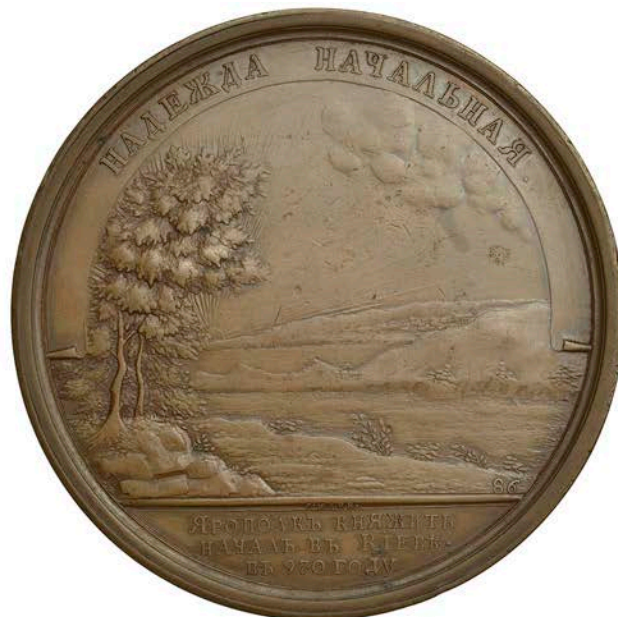
618 Yaropolk (970-80) , a copper medal, struck c. 1783-96, by T. Ivanov and S. Yudin, half-length helmeted and armoured bust right, rev. landscape, two trees to left, sunrise behind , 79mm (Diakov 1753). Some scratches and other minor marks, otherwise good very fine, rare £90-£120 Provenance: Spink Auction 200, 1 and 5 October 2009, lot 568