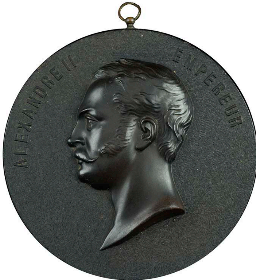
637 Alexander II, a Bois Durci medal, undated, 110mm (Diakov -). About extremely fine, rare