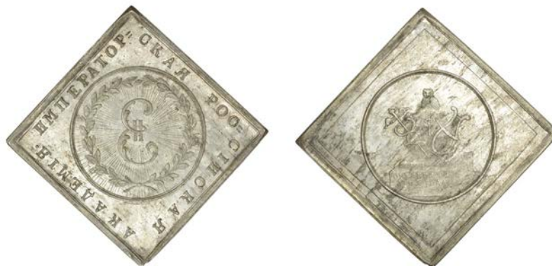
564 Imperial Russian Academy, 1783 , a square silver medal, unsigned, royal cypher within wreath within circle, rev. owl atop globe, holding caduceus, key and lyre, all resting on book on pedestal, all within circle, 35mm, 10.96g (Diakov 199.6). Minor discolouration on reverse, otherwise extremely fine £300-£400