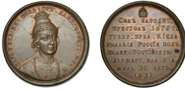
625 Fedor Alexeievich , a copper medal, struck c. 1770, by J.B. Gass, crowned bust facing three-quarters right, rev. legend in eight lines, small crown above, 39mm (Diakov 1655). About extremely fine £150-£200

No. 51 in the portrait series of Russian Grand Dukes, Tsars and Tsarinas