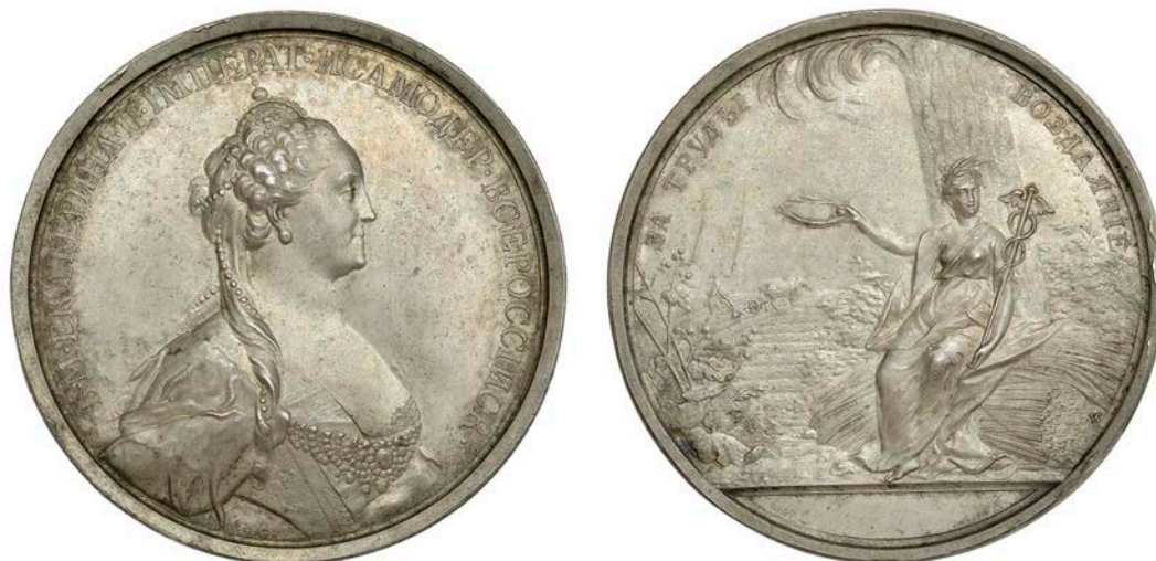
556 Recompense for Labour , a silver medal, undated, by J.B. Gass and G.C. Waechter, crowned bust right, б м ЕКАТЕРИНА II ИМПЕРАТ И САМОДЕР ВСЕРОССИИСК, rev. ЗА ТРУДЫ ВОЗДАНИЕ, Ceres seated left beneath palm tree, holding caduceus and wreath, farmer ploughing field in background to right, 66mm, 95.20g (Diakov 142.1). Two scratches in reverse field and some minor discolouration, otherwise extremely fine, rare £2,000-£2,600