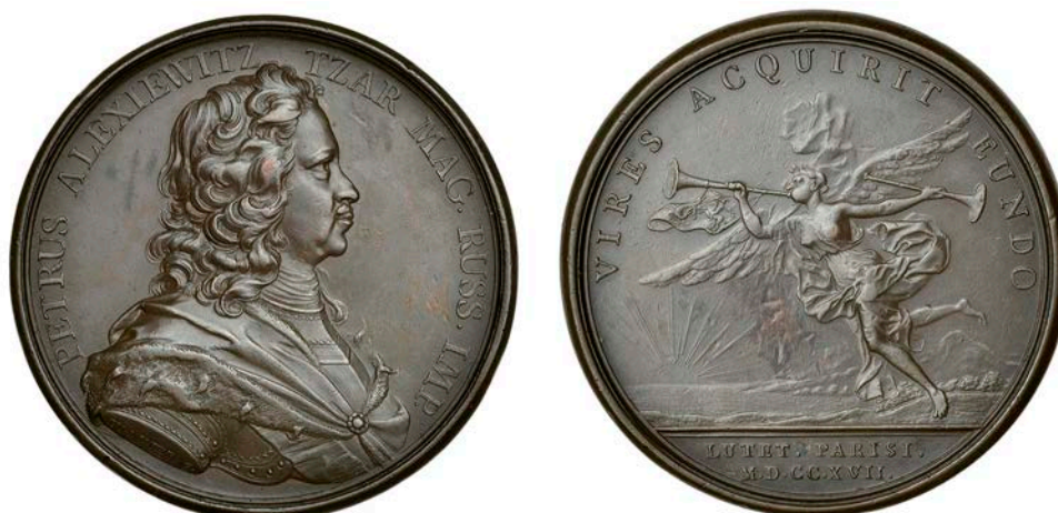
543 Visit of Peter I to the Paris Mint, 1717 , a copper medal by J. Duvivier, armoured bust right, rev. Glory flying left, blowing one trumpet and holding another, 60mm (Diakov 52.1; BDM I, 685). Lightly cleaned, otherwise good very fine £90-£120