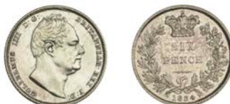
308 Sixpence, 1834 (ESC 2504 [1674]; S 3836). Lightly cleaned, otherwise extremely fine £150-£180