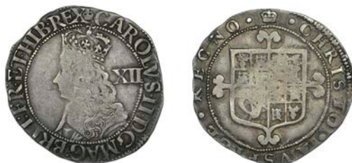
245 Third issue, Shilling, mm. crown, reads BRIT FR ET HIB, 5.81g/4h (ESC 307 [1017]; N 2764; S 3322). Good fine £300-£360