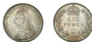
361 Sixpence, 1889 (ESC 3279 [1757]; S 3929). Mint state, attractively toned