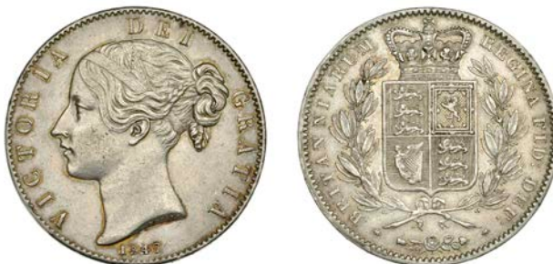
325 Crown, 1847, edge XI (ESC 2567 [286]; S 3882). Good very fine to extremely fine, rare £600-£800