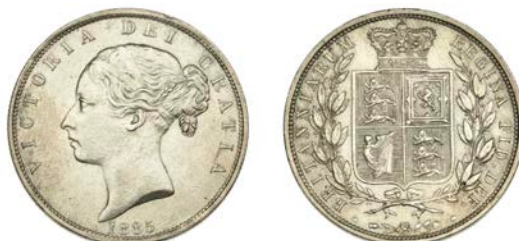
337 Halfcrown, 1885 (ESC 2765 [713]; S 3889). About as struck