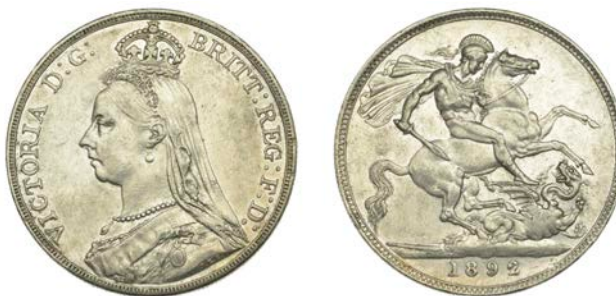
329 Crown, 1892 (ESC 2592 [302]; S 3921). Cleaned, otherwise about extremely fine