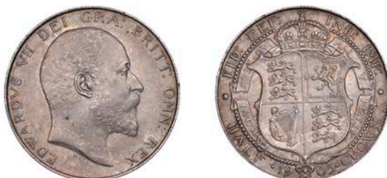
372 Halfcrown, 1905 (ESC 3571 [750]; S 3980). A few tiny surface and rim marks, otherwise virtually mint state, lightly toned, very rare £8,000-£10,000 Provenance: G. Freestone Collection, DNW Auction 165, 4-5 December 2019, lot 237