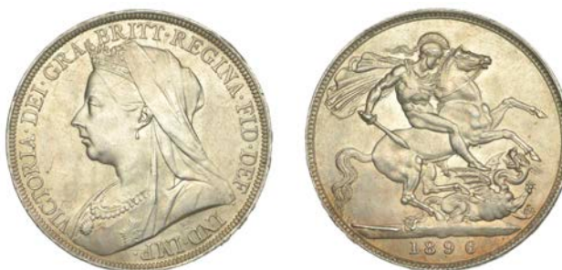
331 Crown, 1896, edge LX (ESC 2601 [311]; S 3937). Extremely fine