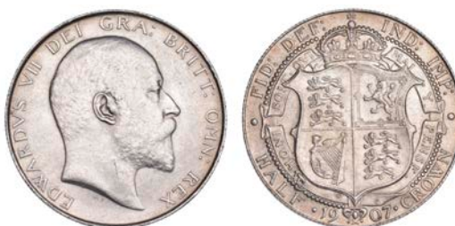
374 Halfcrown, 1907 (ESC 3573 [752]; S 3980). Slight cut on neck, otherwise good extremely fine £240-£300 Provenance: G. Freestone Collection, DNW Auction 165, 4-5 December 2019, lot 239