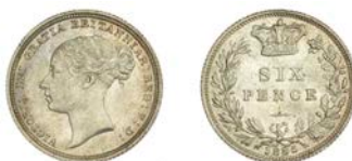
357 Sixpence, 1885 (ESC 3258 [1746]; S 3912). Good extremely fine