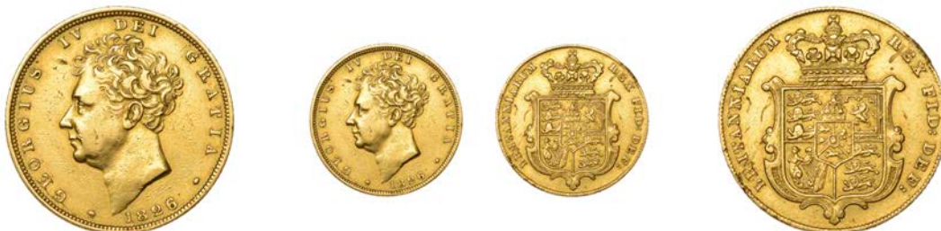
G 299 Sovereign, 1826 (M 11; S 3801). Scuff on reverse and with some edge knocks, otherwise very fine