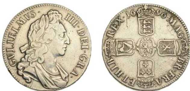
260 Crown, 1696, first bust, edge OCTAVO (ESC 995 [89]; S 3470). Cleaned, otherwise about very fine £150-£180