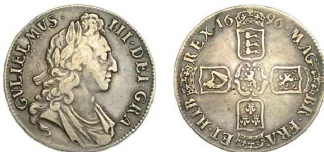
261 Crown, 1696, first bust, edge OCTAVO (ESC 995 [89]; S 3470). Good fine £150-£180