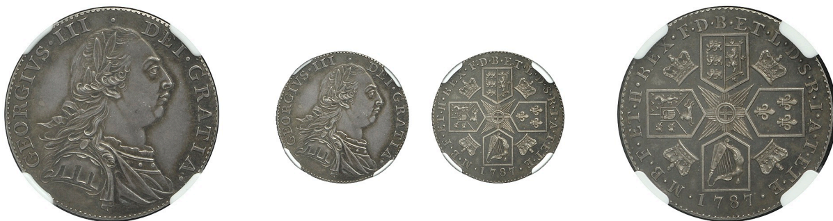
281 Proof Shilling, 1787, by L. Pingo, in silver, bust right, rev. cruciform shields with crowns in angles, semée of hearts, edge plain, 12h (ESC 2171 [1241]; Eimer 85; Selig 1221; S 3746). About mint state, attractively toned [slabbed NGC PF 64+]