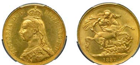
G 314 Two Pounds, 1887 (S 3865). About mint state [slabbed PCGS MS 63]