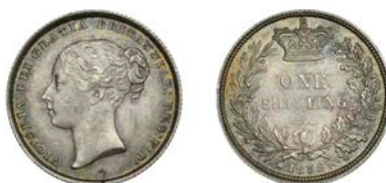
340 Shilling, 1839, second head (ESC 2979 [1283]; S 3904). About as struck, attractive tone