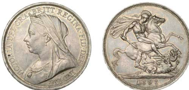
330 Crown, 1893, edge LXI (ESC 2593 [303]; S 3937). Nearly extremely fine, lightly toned