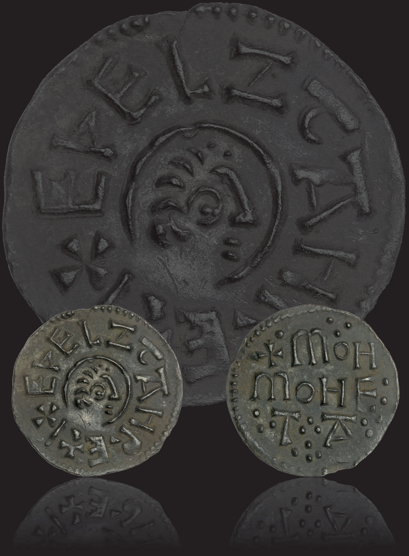
205 Æthelstan I (825-45), Penny, Ipswich, Monne, EDELZTAN REX, draped bust right, rev. +MON MONE TA, in three lines, 1.30g/3h (Naismith E31.1; N 437; S 949). Minor edge chip, original colour and nearly extremely fine, the portrait pleasing, very rare £6,000-£8,000

Provenance: Found in West Norfolk, June 2020 (EMC 2020.0244)