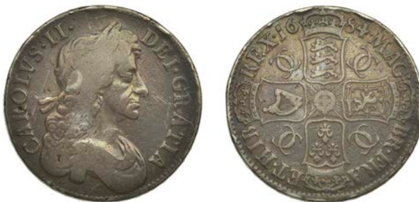
252 Crown, 1684, fourth bust (ESC 420 [67]; S 3359). Numerous edge knocks, otherwise nearly fine, reverse better £150-£200