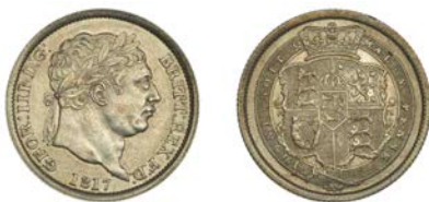
296 Shilling, 1817 (ESC 2144 [1232]; S 3790). Good extremely fine