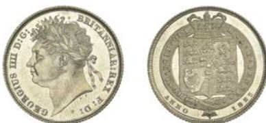
304 Shilling, 1825, type 2 (ESC 2402 [1253]; S 3811). Brilliant, about as struck £300-£400