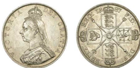
334 Double-Florin, 1887, Roman numeral (ESC 2695 [394]; S 3922). About as struck