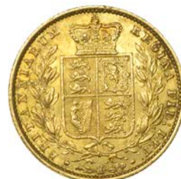
G 318 Sovereign, 1853 (M 36; S 3852C). Good very fine