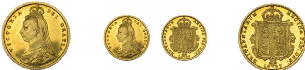
G 323 Proof Half-Sovereign, 1887, edge grained (WR 362; S 3869). Some light marks and hairlines, otherwise about mint state £1,500-£2,000