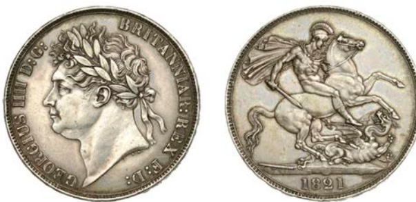
302 Crown, 1821, edge SECUNDO (ESC 2310 [246]; S 3805). Minor marks, otherwise about extremely fine, toned £400-£500