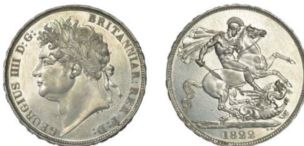
303 Crown, 1822, edge TERTIO (ESC 2320 [252]; S 3805). Of bright appearance, minor surface marks, otherwise about mint state £1,200-£1,500