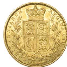
G 317 Sovereign, 1852 (M 35; S 3852C). Good very fine