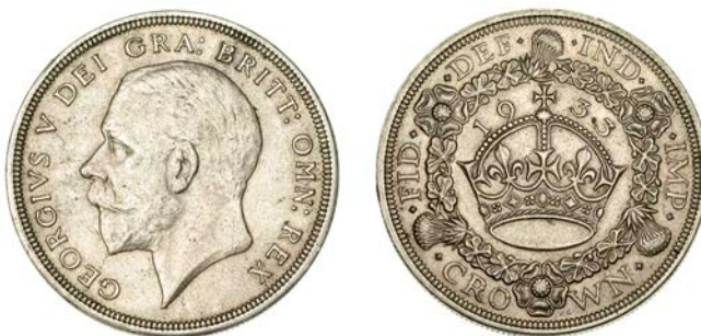
394 Crown, 1933 (ESC 3644 [373]; S 4036). Light surface marks, otherwise about extremely fine