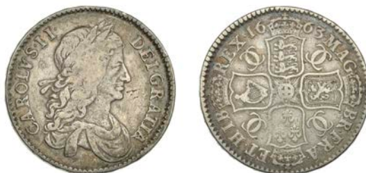
253 Halfcrown, 1663, first bust, edge xv, v over s in CAROLVS (ESC 440 [457A]; S 3361). About very fine, the error very rare £300-£400