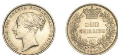
342 Shilling, 1846 (ESC 2992 [1293]; S 3904). Lightly cleaned and with some minor marks, otherwise extremely fine