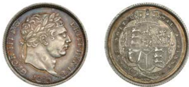
297 Shilling, 1819/8 (ESC 2152 [1235]; S 3790). Extremely fine, toned