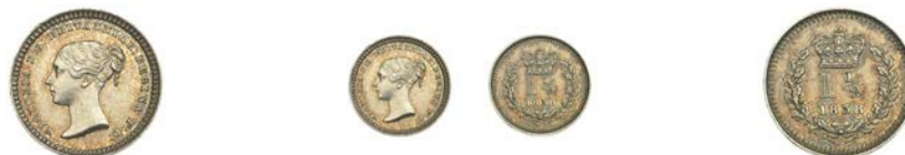
363 Threehalfpence, 1838 (ESC 3461 [2254]; S 3915). About as struck