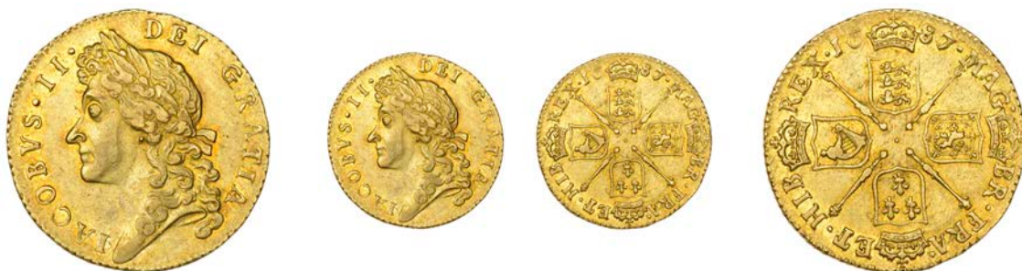
257 Guinea, 1687/6, second bust (MCE 128; S 3402). Good very fine or better, with traces of original bloom £3,000-£3,600