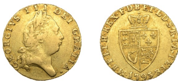
278 Half-Guinea, 1793, fifth bust (MCE 432; S 3735). Fine