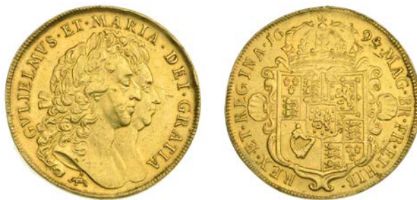
258 Five Guineas, 1694, elephant and castle (MCE 142; S 3423). Edge smoothed to allow for a ring mount, otherwise better than very fine, attractive, rare £4,000-£5,000