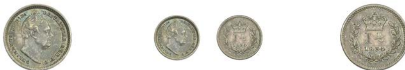
309 Threehalfpence, 1834 (ESC 2539 [2250]; S 3839). Extremely fine, attractively toned