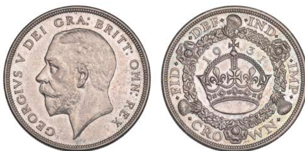
390 Crown, 1931 (ESC 3639 [371]; S 4036). Extremely fine or better

Provenance: G. Freestone Collection, DNW Auction 165, 4-5 December 2019, lot 269