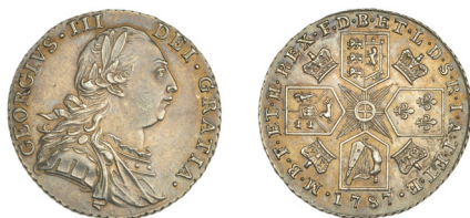
279 Shilling, 1787, no hearts, no stop over head (ESC 2133 [1218]; S 3744). About extremely fine with some toning