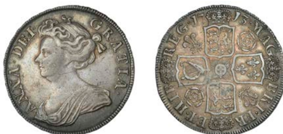
266 Halfcrown, 1713, roses and plumes, edge DVODECIMO (ESC 1375 [584]; S 3607). A few surface marks, otherwise better than very fine, toned £300-£360