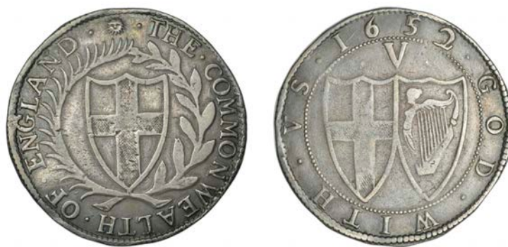
242 Crown, 1652/1, mm. sun on obv. only, 29.89g/6h (ESC 5 [5]; N 2721; S 3214). Full and round, better than very fine but slightly weak in centres £2,000-£2,400