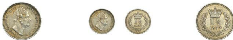
310 Threehalfpence, 1835/4 (ESC 2542 [2251A]; S 3839). About as struck