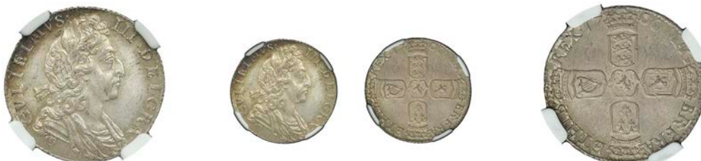
263 Sixpence, 1700, third bust (ESC 1250 [1579]; S 3538). About as struck, toned [slabbed NGC MS 64] £300-£400