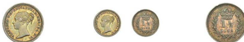
364 Threehalfpence, 1839 (ESC 3464 [2255]; S 3915). About as struck, toned