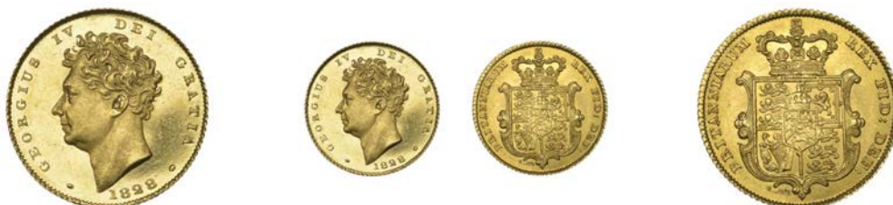
G 301 Half-Sovereign, 1828 (M 409; S 3804). Tiny mark on cheek, otherwise virtually mint state, the obverse proof-like [slabbed NGC MS 65+]