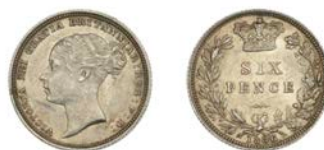
358 Sixpence, 1886 (ESC 3260 [1748]; 3912). Good extremely fine