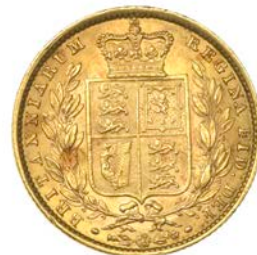
G 320 Sovereign, 1862, wide date (M 45; S 3852D). About extremely fine