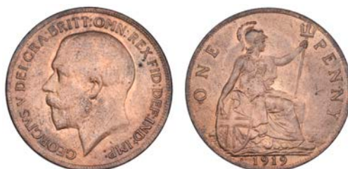
399 Penny, 1919 H (F 186; BMC 2256; S 4052). A little weak, otherwise good extremely fine with some original colour

Provenance: G. Freestone Collection, DNW Auction 165, 4-5 December 2019, lot 310