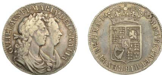
259 Halfcrown, 1689, second shield, caul only frosted, pearls, edge PRIMO (ESC 842 [510]; S 3435). Nearly very fine £200-£260