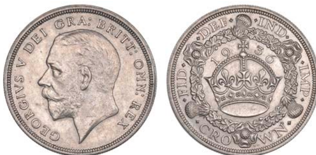
395 Crown, 1936 (ESC 3649 [381]; S 4036). Nearly extremely fine

Provenance: G. Freestone Collection, DNW Auction 165, 4-5 December 2019, lot 274