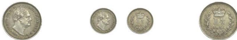
311 Threehalfpence, 1836 (ESC 2543 [2252]; S 3839). About as struck, lightly toned