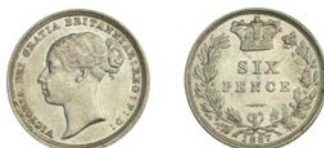
360 Sixpence, 1887, young head (ESC 3262 [1750]; S 3912). Good extremely fine