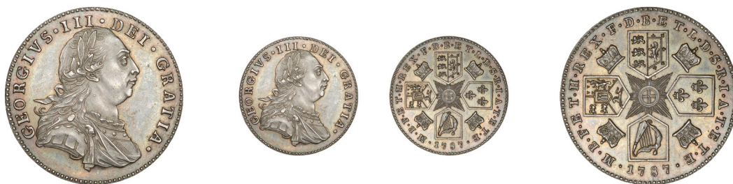
284 Proof Sixpence, 1787, by L. Pingo, in silver, bust right, rev. cruciform shields with crowns in angles, semée of hearts in Hanoverian arms, edge plain, 3.17g/12h (ESC 2212 [1640]; Eimer 86; Selig 1228). About as struck, attractive tone