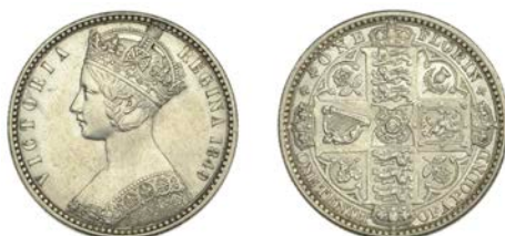
338 Florin, 1849, initials almost completely obliterated (ESC 2817 [802A]; S 3890). Lightly cleaned, otherwise good extremely fine