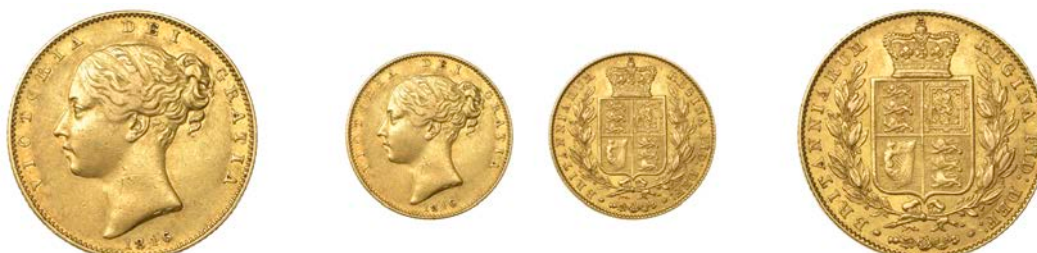
G 315 Sovereign, 1846 (M 29; S 3852). Very fine