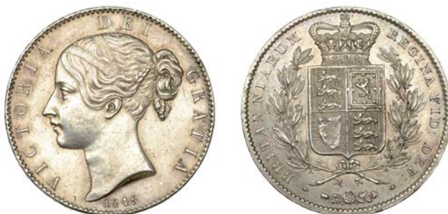
324 Crown, 1845, edge VIII, cinquefoil stops (ESC 2564 [282]; S 3882). Very minor surface marks, otherwise almost as struck, mint bloom £2,000-£2,600