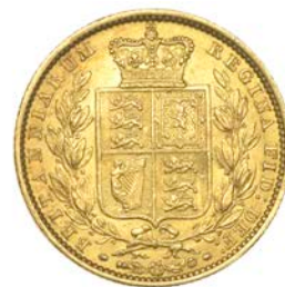
G 316 Sovereign, 1850 (M 33; S 3852C). Good very fine