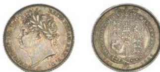
306 Sixpence, 1825 (ESC 2427 [1659]; S 3814). About as struck, attractively toned £150-£180