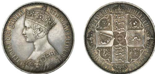
327 'Gothic' Crown, 1847, edge UNDECIMO (ESC 2571 [288]; S 3883). Nearly extremely fine £2,000-£2,400