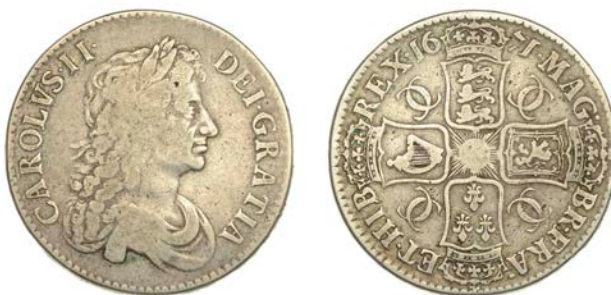
249 Crown, 1671, third bust, edge VICESIMO TERTIO (ESC 386 [43]; S 3358). Good fine £150-£180