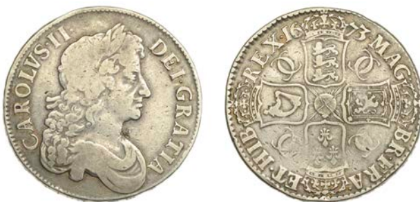
250 Crown, 1673, third bust, edge VICESIMO QUINTO (ESC 390 [47]; S 3358). Some minor marks, otherwise good fine £200-£260