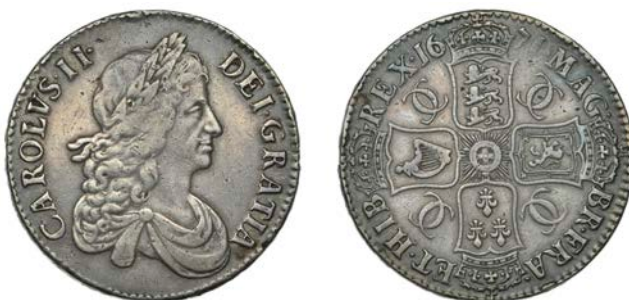
247 Crown, 1671, second bust, edge VICESIMO TERTIO (ESC 382 [42]; S 3357). Small rim flaw at 5 o'clock, otherwise about very fine, reverse better £400-£600