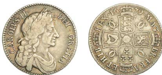
255 Halfcrown, 1679, fourth bust, edge TRICESIMO PRIMO (ESC 480 [481]; S 3367). About very fine £200-£260