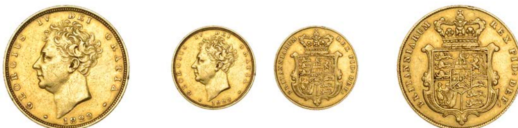
G 300 Sovereign, 1829 (M 14; S 3801). Some surface marks, otherwise very fine