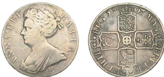
264 Crown, 1707E, second bust, edge SEXTO (ESC 1352 [103]; S 3600). Fine, reverse better £200-£260