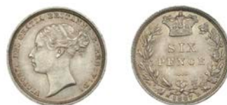
359 Sixpence, 1887, young head (ESC 3262 [1750]; 3912). About as struck