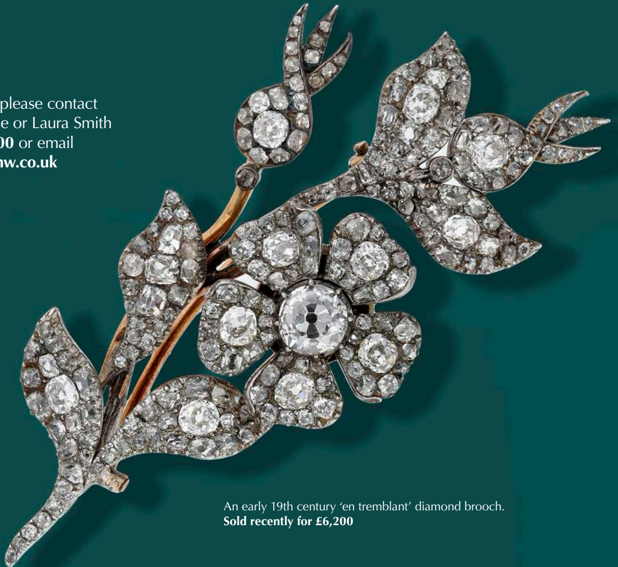
An early 19th century 'en tremblant' diamond brooch. Sold recently for £6,200