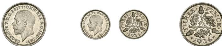
398 Proof Threepence, 1934, edge plain, 1.42g/12h (ESC 3958 [2147A]; S –). Mint state, attractively toned and extremely rare

Provenance: L.M. Noad Collection, Mark Rasmussen FPL 30, Spring 2017 (C 474)