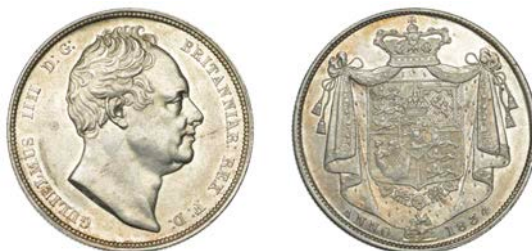
307 Halfcrown, 1834, ww in script (ESC 2478 [662]; S 3834). Of bright appearance, marks in obverse field, otherwise extremely fine £360-£400