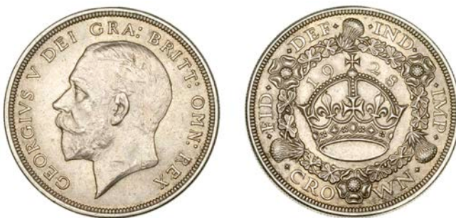
389 Crown, 1928 (ESC 3633 [368]; S 4036). About extremely fine, lightly toned