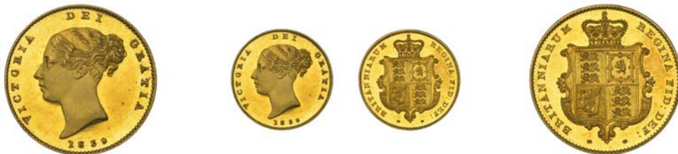
G 322 Proof Half-Sovereign, 1839, edge plain, 4.02g/6h (WR 344; S 3859). A little hairlined, otherwise about mint state, surfaces brilliant [slabbed NGC PF 63 Ultra Cameo] £4,000-£5,000