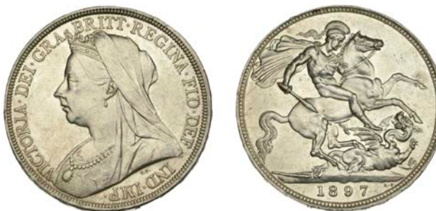
332 Crown, 1897, edge LXI (ESC 2603 [313]; S 3937). Some minor marks, otherwise good extremely fine