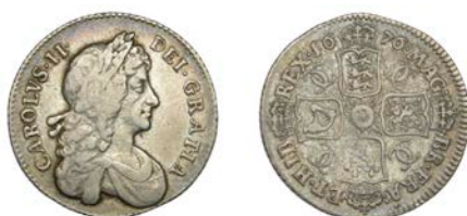
256 Shilling, 1676, second bust, no stop after HIB (ESC 536 [1047]; S 3375). Good fine £150-£200