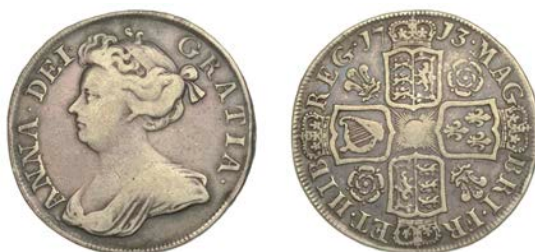
267 Halfcrown, 1713, roses and plumes, edge DVODECIMO (ESC 1375 [584]; S 3607). Good fine £150-£180