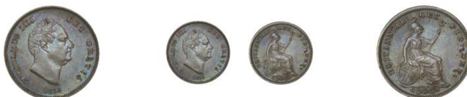
312 Proof Third-Farthing, 1835, edge plain, 1.58g/12h (Cooke 1635; BMC 1478; S 3850). About as struck