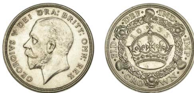
391 Crown, 1933 (ESC 3644 [373]; S 4036). About as struck