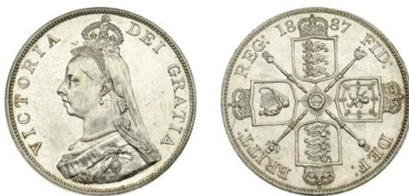
336 Double-Florin, 1887, Arabic numeral (ESC 2697 [395]; S 3923). About as struck