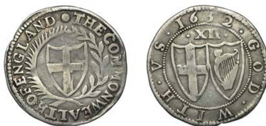
243 Shilling, 1652, mm. sun on obv. only, 5.63g/8h (ESC 103 [985]; N 2724; S 3217). Better than fine, on a full flan £150-£200