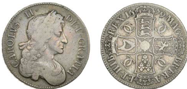
251 Crown, 1679, fourth bust, edge TRICESIMO PRIMO, no stop after HIB (ESC –; cf. S 3359). Good fine and extremely rare, the variety apparently unrecorded £300-£400