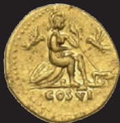
582 Titus (as Cæsar ), Aureus, Rome, 77-8, T CAESAR IMP VESPASIANVS, laureate bust right, rev. Roma seated right on two oval shields, holding transverse spear, flanked by two flying eagles, to right miniature she-wolf suckling Romulus and Remus, COS VI in exergue, 7.29g (Calicó 738; RIC Vespasian 954; BMC 223). Light surface marks, otherwise about extremely fine with underlying bloom £4,000-£5,000

Provenance: Found in Carlisle (Cumbria) 2013; PAS DUR-FF7235