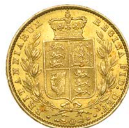
G 319 Sovereign, 1859 (M 42; S 3852D). Good very fine