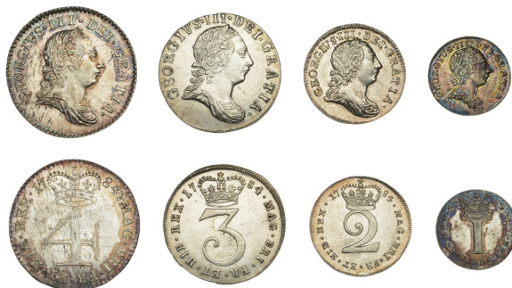
285 Maundy set, 1784 (ESC 2235 [2417]; S 3762) [4]. Extremely fine