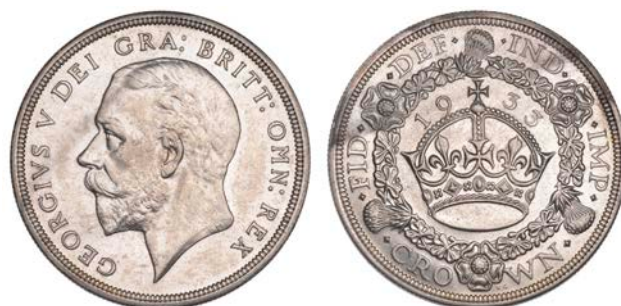
392 Crown, 1933 (ESC 3644 [373]; S 4036). Good extremely fine

Provenance: G. Freestone Collection, DNW Auction 165, 4-5 December 2019, lot 271