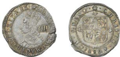
246 Third issue, Groat, 1.93g/1h (ESC 322 [1839]; N 2768; S 3324). On a full flan, better than very fine and toned, but slightly weak on portrait £120-£150