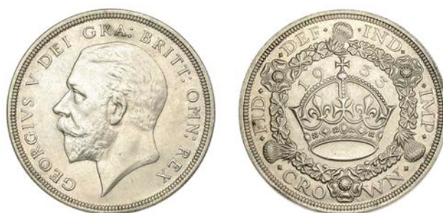
393 Crown, 1933 (ESC 3644 [373]; S 4036). Nearly extremely fine