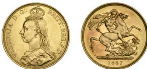
G 313 Two Pounds, 1887 (S 3865). About as struck