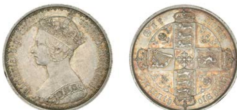
339 Florin, 1872, die 149 (ESC 2878 [840]; S 3893). About as struck, attractively toned