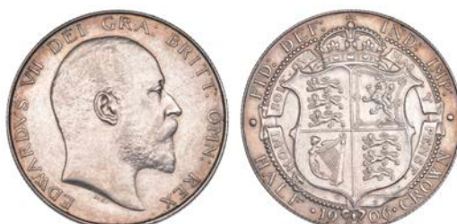
373 Halfcrown, 1906 (ESC 3572 [751]; S 3980). Extremely fine, reverse better, light peripheral toning £240-£300 Provenance: G. Freestone Collection, DNW Auction 165, 4-5 December 2019, lot 238