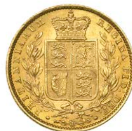
G 321 Sovereign, 1872, no die number (M 47; S 3853B). About extremely fine