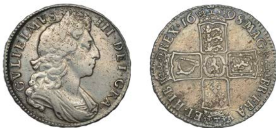
262 Halfcrown, 1698, edge DECIMO (ESC 1034 [554]; S 3494). Some light haymarking, otherwise good fine £150-£200