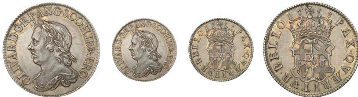
244 Shilling, 1658 (Lessen J28; ESC 254 [1005]; S 3228). Light wear to high points and minor surface marks on obverse, otherwise extremely fine, attractive tone £3,000-£3,600