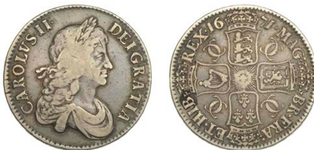
248 Crown, 1671, second bust, edge VICESIMO TERTIO (ESC 382 [42]; S 3357). Good fine £200-£260