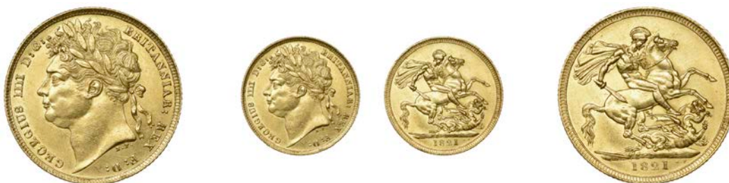
G 298 Sovereign, 1821 (M 5; S 3800). Has been cleaned in the past, some surface marks, otherwise extremely fine or better