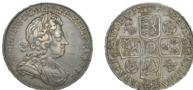
231 Crown, 1720/18, roses and plumes, edge SEXTO (ESC 1543 [113]; S 3639). A few small edge nicks, otherwise good very fine