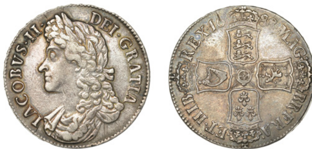
188 Crown, 1688/7, second bust, edge QVARTO (ESC 747 [81]; S 3407). Lightly cleaned, otherwise good very fine £600-£800