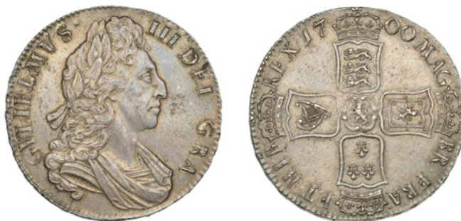
208 Crown, 1700, third bust variety, edge DVODECIMO (ESC 1010 [97]; S 3474). Minor flan flaws on obverse, otherwise about extremely fine