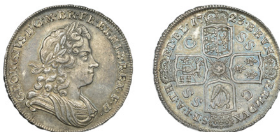
233 Halfcrown, 1723 ss c, edge DECIMO (ESC 1557 [592]; S 3643). Good very fine, reverse better, toned