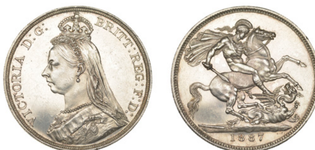
313 Proof Crown, 1887, edge grained, 28.25g/12h (ESC 2586 [297]; S 3921). Fields lightly hairlined and a few minor marks, otherwise about as struck