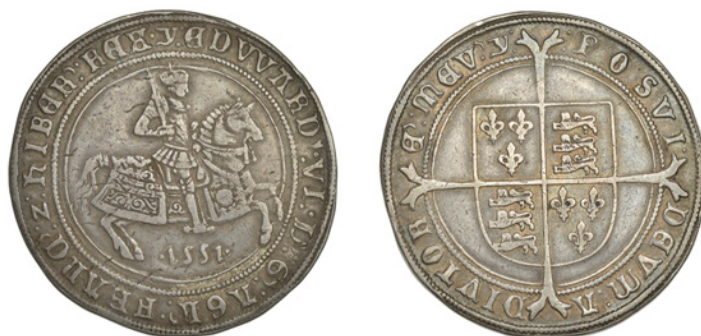
121 Third period, Fine issue, Crown, 1551, mm. y, reads FRANC' : z : HIBER', 30.93g/9h (Lingford dies B-7; N 1933; S 2478). Very fine, toned £2,000-£2,600 Provenance: Bt Baldwin