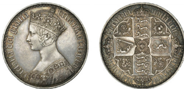
311 'Gothic' Crown, 1847, edge UNDECIMO (ESC 2571 [288]; S 3883). Nearly extremely fine