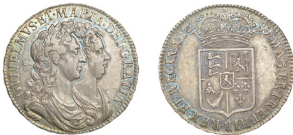
194 Halfcrown, 1689, first shield, caul and interior frosted, pearls, edge PRIMO (ESC 826 [503]; S 3434). Good very fine, toned £300-£400