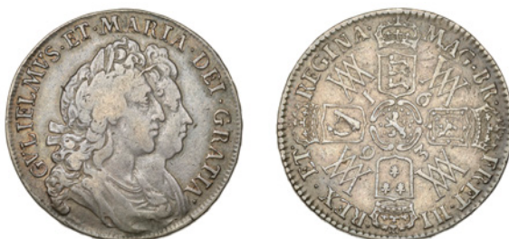
201 Halfcrown, 1693, edge QUINTO (ESC 860 [519]; S 3436). Very fine £300-£400