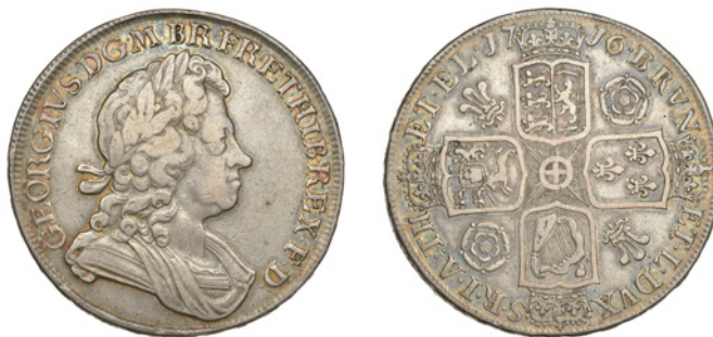
230 Crown, 1716, roses and plumes, edge SECVNDO (ESC 1540 [110]; S 3639). Very fine, toned Provenance: DNW Auction 40, 14 April 1999, lot 190