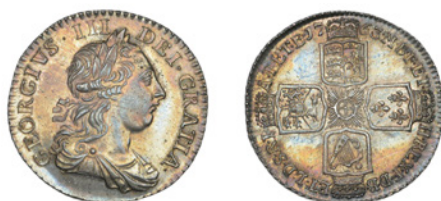
268 'Northumberland' Shilling, 1763, harp with 8 strings (ESC 2124 [1214]; S 3742). Extremely fine