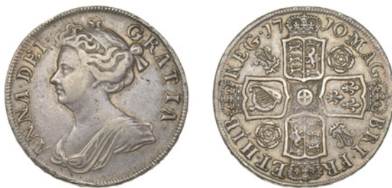
222 Halfcrown, 1710, roses and plumes, edge NONO (ESC 1372 [581]; S 3607). Very fine