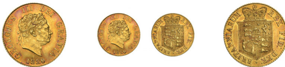
G 276 Half-Sovereign, 1820 (M 402; S 3786). Good extremely fine, reddish tone £800-£1,000