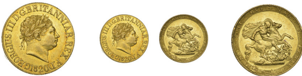
G 275 Sovereign, 1820, open 2 (M 4; S 3785C). Some surface marks and edge nicks, otherwise almost extremely fine £1,200-£1,500