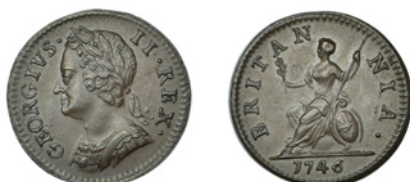
261 Farthing, 1746 (Cooke 377; BMC 887; S 3722). Good extremely fine, attractive brown patina