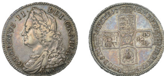
254 Halfcrown, 1745 LIMA , edge DECIMO NONO (ESC 1687 [605]; S 3695). Very fine or better £200-£240