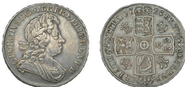
232 Crown, 1726, roses and plumes, edge DECIMO TERTIO (ESC 1546 [115]; S 3639A). Obverse about very fine, reverse good very fine, rare