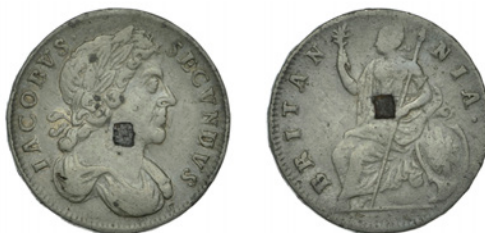
192 Halfpenny, 1687, D of SECVNDVS over uncertain letter, perhaps an o (cf. BMC 544; S 3419). Brass plug; almost free of tin pest, very fine or better for issue £2,000-£2,600