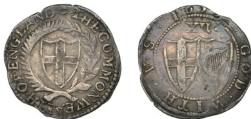
168 Shilling, 1653, mm. sun on obv. only, 5.35g/4h (ESC 124 [987]; N 2724; S 3217). Nearly very fine £200-£260