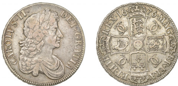
180 Crown, 1676, third bust, edge VICESIMO OCTAVO (ESC 397 [51]; S 3358). About very fine £240-£300