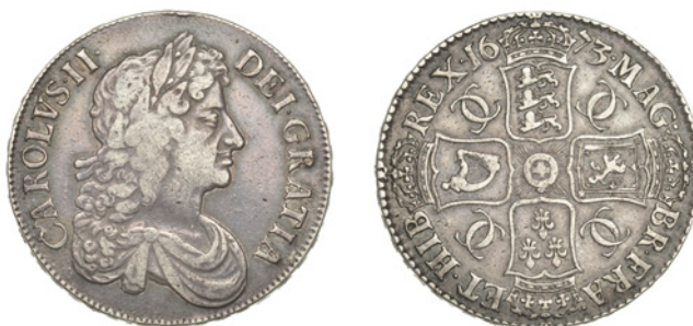
179 Crown, 1673, third bust, edge VICESIMO QVINTO (ESC 390 [47]; S 3358). About very fine £300-£400