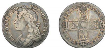
190 Shilling, 1687/6, broken B in IACOBVS, G over A in MAG, harp with 6 strings (ESC 770 [1072A]; S 3410). Good fine £200-£260