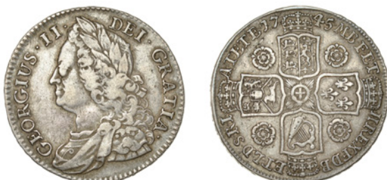
252 Halfcrown, 1745, roses, edge DECIMO NONO (ESC 1685 [604]; S 3694). About very fine £150-£180