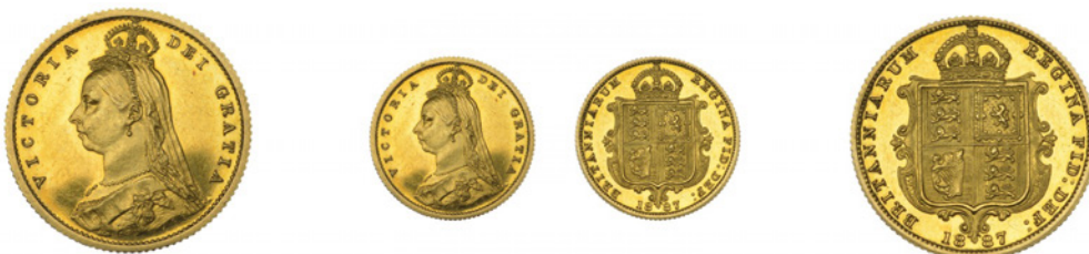
G 307 Proof Half-Sovereign, 1887, edge grained (WR 362; S 3869). Some light marks and hairlines, otherwise about mint state £1,800-£2,000