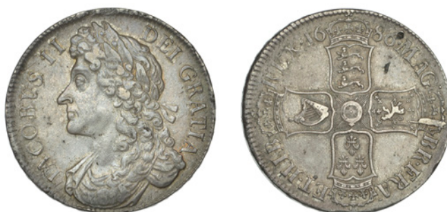
186 Crown, 1686, first bust, edge SECUNDO, no stops on obv. (ESC 741 [77]; S 3406). Small metal flaw by second 6 of date, otherwise better than very fine, toned Provenance: J.M. Ashby Collection, Spink Auction 145, 12-14 July 2000, lot 2410 [from E.H. Woodiwiss July 1963]