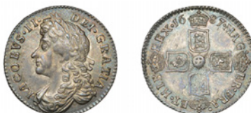
191 Sixpence, 1687, later shields (ESC 777 [1526B]; S 3413). Extremely fine and attractively toned £700-£800