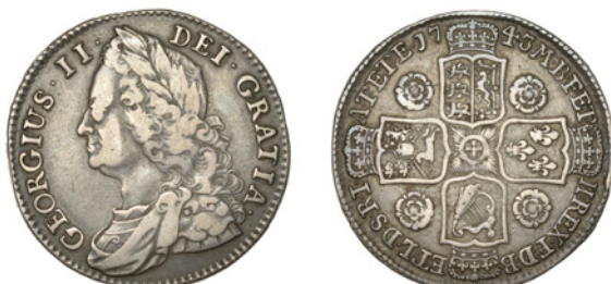
251 Halfcrown, 1743, roses, edge DECIMO SEPTIMO (ESC 1684 [603A]; S 3694). About very fine £150-£180