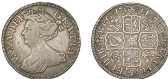
226 Halfcrown, 1714, roses and plumes, edge DECIMO TERTIO (ESC 1377 [585]; S 3607). About very fine