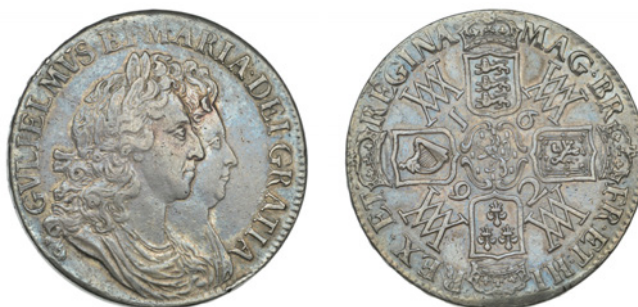
193 Crown, 1692, edge QVARTO (ESC 822 [83]; S 3433). Nearly very fine, reverse better £1,000-£1,200