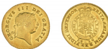
G 263 Half-Guinea, 1810, seventh bust (MCE 446; S 3737). Extremely fine Provenance: DNW Auction 35, 3 April 1998, lot 103