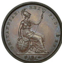
301 Proof Penny, 1831, bronzed, edge plain, 18.71g/6h (BMC 1457; S 3845). Minor surface marks, otherwise about as struck