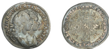
203 Sixpence, 1693 (ESC 869 [1529]; S 3438). Good fine, reverse a little better