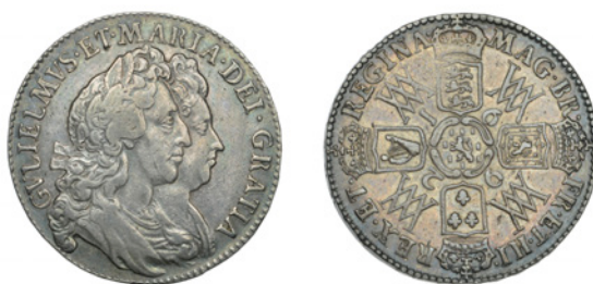
200 Halfcrown, 1692, edge QUINTO (ESC 855 [518]; S 3436). Very fine, reverse better, toned £440-£500