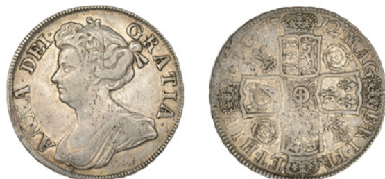
223 Halfcrown, 1712, roses and plumes, edge UNDECIMO (ESC 1374 [582]; S 3607). About very fine