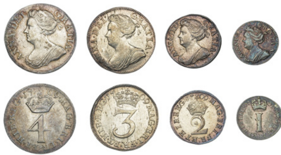
229 Maundy set, 1709 (ESC 1477 [2397]; S 3599) [4]. Nearly extremely fine