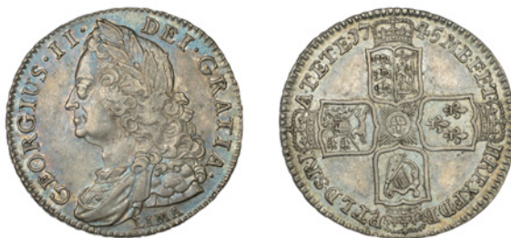
253 Halfcrown, 1745 LIMA , edge DECIMO NONO (ESC 1687 [605]; S 3695). Good very fine, reverse a little better £200-£240