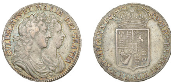
197 Halfcrown, 1689, second shield, caul only frosted, pearls, edge PRIMO (ESC 839 [510]; S 3435). Some light scratches, otherwise very fine £200-£260