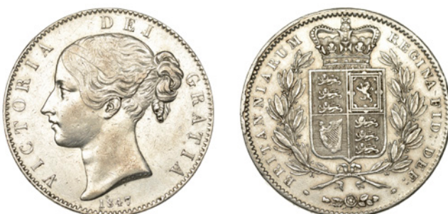
310 Crown, 1847, edge XI (ESC 2567 [286]; S 3882). Lightly cleaned and some contact marks, otherwise good very fine £240-£300