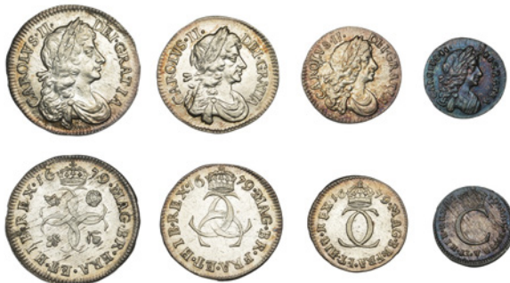
184 Maundy set, 1679 (ESC 602 [2375]; S 3392) [4]. Extremely fine