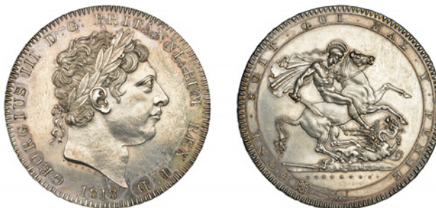
277 Crown, 1818, edge LVIII (ESC 2005 [211]; S 3787). A few minor surface marks, otherwise good extremely fine, lightly toned £500-£600