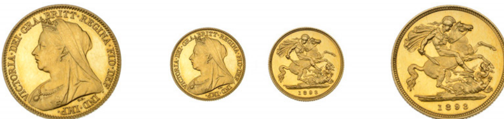
G 308 Proof Half-Sovereign, 1893, edge grained, 3.98g/12h (WR 363; S 3878). Very minor surface hairlines, otherwise about as struck, brilliant £1,500-£2,000