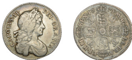
182 Shilling, 1676, second bust, no stop after HIB (ESC 536 [1047]; S 3375). Good fine