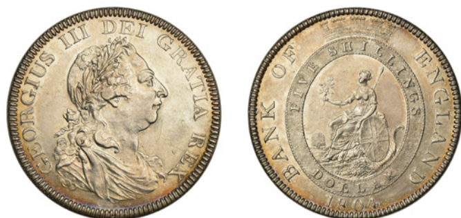
274 Dollar, 1804, types E/2, leaf to centre of ε in DEI (ESC 1951 [164]; S 3768). Cleaned and with some contact marks, otherwise very fine £150-£180 Provenance: DNW Auction 42, 8 September 1999, lot 441