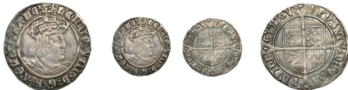
117 Second coinage, Groat, Tower, mm. lis, bust D, 2.59g/9h (N 1797; S 2337E). Very fine £200-£260