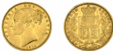
G 305 Sovereign, 1852 (M 35; S 3852C). Contact marks, otherwise good very fine £240-£300