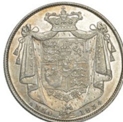
298 Halfcrown, 1834, ww in script (ESC 2478 [662]; S 3834). Mark in obverse field, otherwise extremely fine