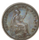
302 Proof Third-Farthing, 1835, edge plain, 1.58g/12h (Cooke 1635; BMC 1478; S 3850). About as struck