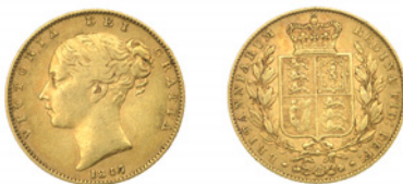
G 304 Sovereign, 1847 (M 30; S 3852). Very fine £240-£300