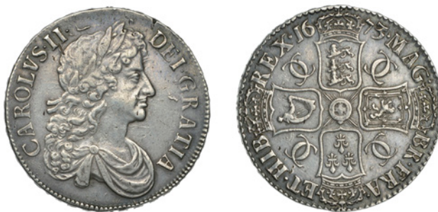
178 Crown, 1673, third bust, edge VICESIMO QVINTO (ESC 390 [47]; S 3358). Small edge flaw at 1 o'clock, otherwise good very fine, lightly toned £800-£1,000