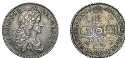
181 Shilling, 1663, first bust variety (ESC 506 [1025]; S 3372). Light mark on jaw-line, otherwise good very fine or better, toned £500-£600