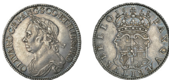
170 Halfcrown, 1658 (Lessen I26; ESC 252 [447]; S 3227A). A few field and surface marks, otherwise nearly extremely fine, toned £3,000-£3,400