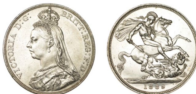
314 Crown, 1889 (ESC 2589 [299]; S 3921). A few minor marks, otherwise about as struck