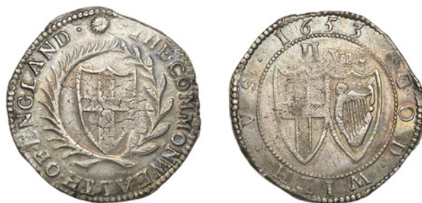
167 Halfcrown, 1653, mm. sun on obv. only, 14.58g/10h (ESC 28 [431]; N 2722; S 3215). Good very fine, toned £600-£800 Provenance: DNW Auction 30, 16 July 1997, lot 182