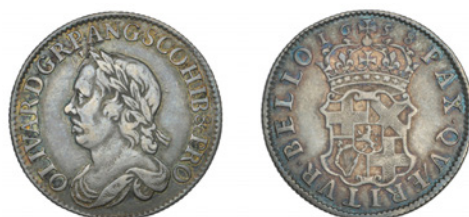
171 Shilling, 1658 (Lessen J28; ESC 254 [1005]; S 3228). Nearly very fine £1,200-£1,500