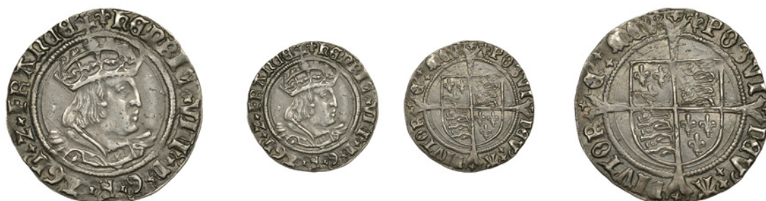
118 Second coinage, Groat, Tower, mm. lis, bust D, 2.65g/10h (N 1797; S 2337E). Very fine £200-£260