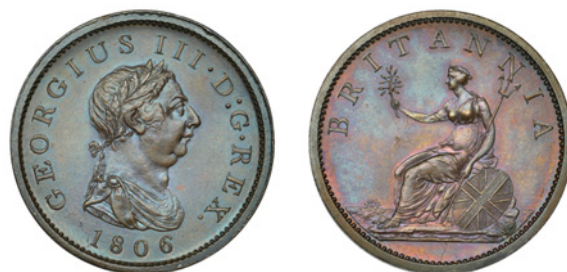
270 Proof Penny, 1806 (late Soho), in bronzed-copper, edge centre-grained, 18.99g/6h (BMC 1328 [KP 32]; Selig 1305; S 3780). About as struck