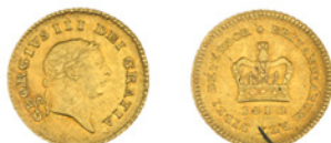
G 265 Third-Guinea, 1810, second bust (MCE 460; S 3740). Flan flaw on reverse, otherwise about extremely fine