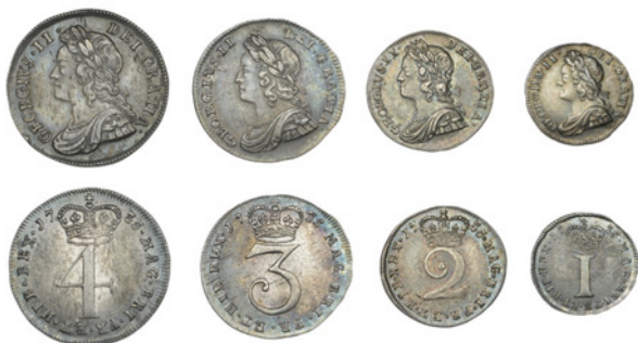
259 Maundy set, 1735 (ESC 1768 [2405]; S 3716) [4]. Nearly extremely fine with attractive toning