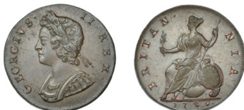
260 Halfpenny, 1729 (BMC 830; S 3717). Extremely fine, traces of original colour