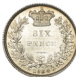
300 Sixpence, 1834 (ESC 2504 [1674]; S 3836). About mint state