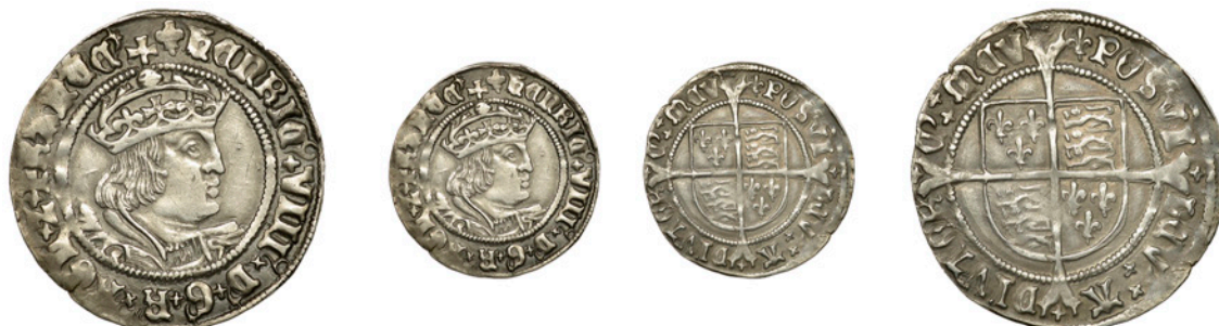
119 Second coinage, Groat, Tower, mm. lis, bust D, 2.77g/12h (N 1797; S 2337E). Lightly cleaned, otherwise very fine £200-£260