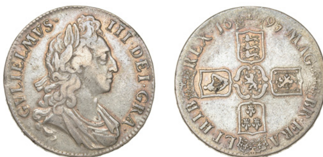
204 Crown, 1695, first bust, edge OCTAVO (ESC 991 [87]; S 3470). About very fine