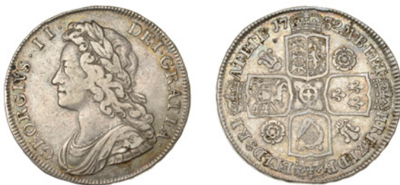
250 Halfcrown, 1732, roses and plumes, edge SEXTO (ESC 1675 [596]; S 3692). Small dig on reverse, otherwise about very fine £200-£260