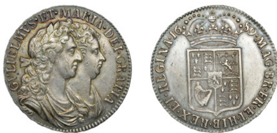
198 Halfcrown, 1689, second shield, no frosting or pearls, edge PRIMO (ESC 846 [512]; S 3435). Minimal haymarking, nearly extremely fine, toned £900-£1,000