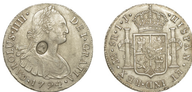
272 PERU, Charles III, 8 Réales, 1794, Lima, obv. countermarked with head of George III in oval, 26.97g (ESC – [133]; S 3765A). Lightly cleaned, otherwise coin and countermark good very fine