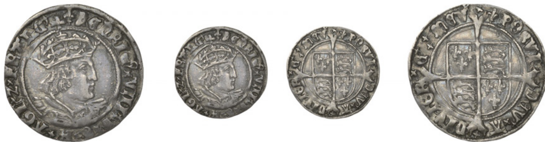
116 Second coinage, Groat, Tower, mm. lis, bust D, 2.76g/11h (N 1797; S 2337E). Very fine, toned £200-£260