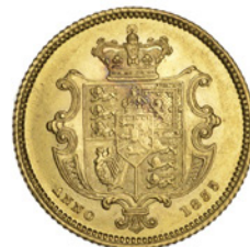
G 297 Half-Sovereign, 1835 (M 411; S 3831). Virtually mint state