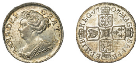
227 Shilling, 1707, third bust (ESC 1395 [1141]; S 3610). Minimal obverse haymarking, otherwise virtually as struck, mint bloom