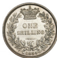
299 Shilling, 1834 (ESC 2489 [1268]; S 3835). Of bright appearance, extremely fine or better