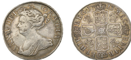
225 Halfcrown, 1713, roses and plumes, edge DVODECIMO (ESC 1375 [584]; S 3607). Very fine