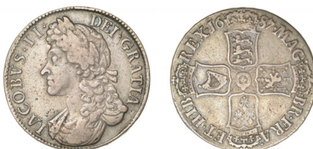
187 Crown, 1687, second bust, edge TERTIO (ESC 743 [78]; S 3407). About very fine