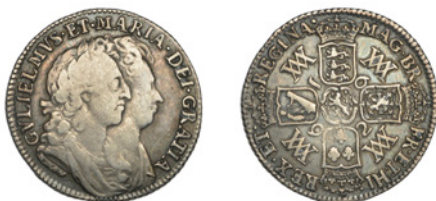
202 Shilling, 1692, no stop after BR, RE of REX over ET (ESC 865 [1075]; S 3437). Good fine