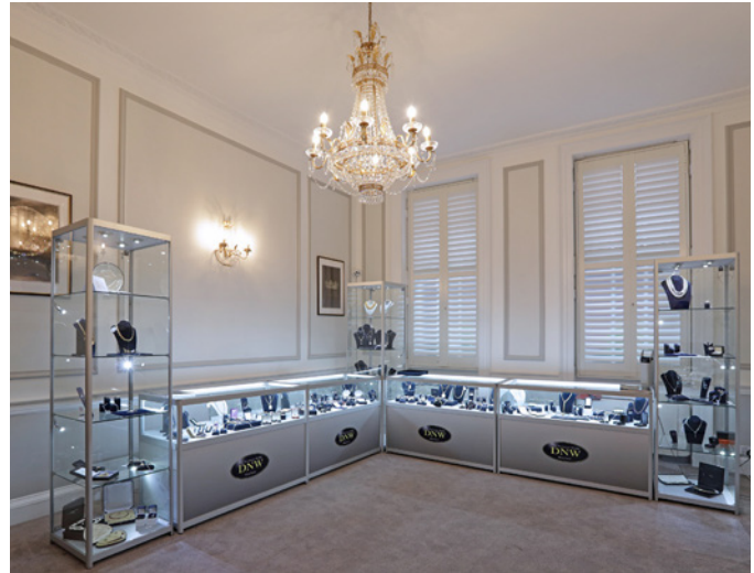
Jewellery viewing room

We hold over 20 auctions each year, the full contents of which are published on the internet around one month before the sale date, together with a unique preview facility which is available as lots are catalogued and photographed. Printed auction catalogues are normally mailed to subscribers approximately three weeks prior to each sale.