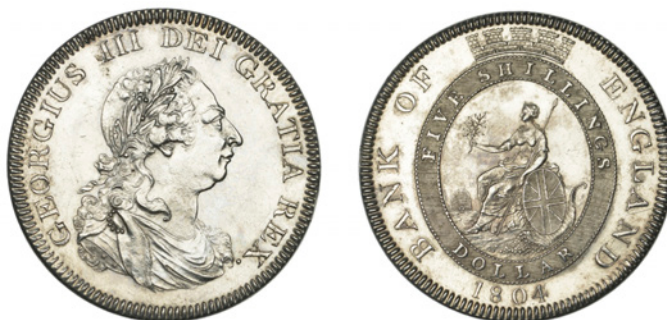
273 Dollar, 1804, types A/2, leaf to upright of ε, c · h · κ on truncation, κ upright, edge plain, 27.00g/12h (ESC 1926 [145]; S 3768). Extremely fine or better but sometime cleaned, possibly an impaired Proof £500-£600