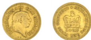
G 264 Third-Guinea, 1806, second bust (MCE 457; S 3740). Very fine Provenance: DNW Auction 35, 3 April 1998, lot 105