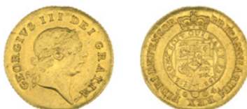
G 262 Half-Guinea, 1804, seventh bust (MCE 442; S 3737). Extremely fine Provenance: DNW Auction 35, 3 April 1998, lot 101