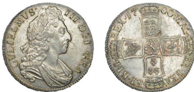
207 Crown, 1700, third bust variety, edge DVODECIMO (ESC 1010 [97]; S 3474). A few light marks in obverse field, otherwise good extremely fine