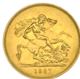
G 303 Five Pounds, 1887 (S 3864). Fields hairlined, some minor marks, otherwise extremely fine Provenance: Glendining Auction, 8 May 1991, lot 16