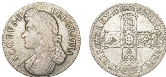
189 Crown, 1688, second bust, edge QVARTO (ESC 746 [80]; S 3407). Good fine £200-£260