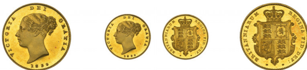
G 306 Proof Half-Sovereign, 1839, edge plain, 4.02g/6h (WR 344; S 3859). About mint state, surfaces brilliant but hairlined £5,000-£6,000