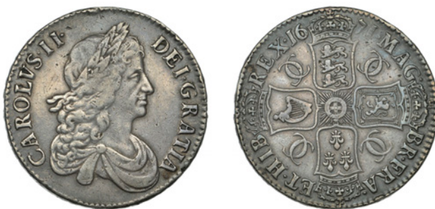
177 Crown, 1671, second bust, edge VICESIMO TERTIO (ESC 382 [42]; S 3357). Small rim flaw at 5 o'clock, otherwise about very fine, reverse better £500-£700