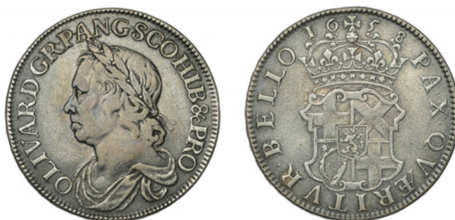
169 Crown, 1658/7 (Lessen E12; ESC 240 [10]; S 3226). Evidence of repair in centre of obverse, otherwise good fine, dark tone £1,500-£2,000