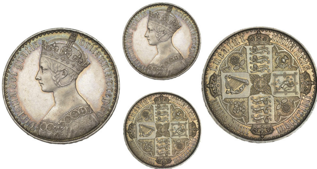
232 'Gothic' Crown, 1847, edge UNDECIMO (ESC 2571 [288]; S 3883). Good extremely fine, attractive tone £2,800-£3,000