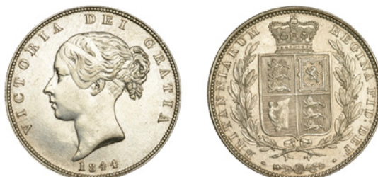
236 Halfcrown, 1844 (ESC 2720 [677]; S 3888). Minor surface marks, otherwise extremely fine, scarce £400-£460