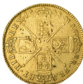
135 Five Guineas, 1688, second bust (S 3397A). Has been removed from a mount, otherwise almost very fine £4,000-£5,000