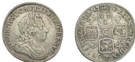
172 Shilling, 1723 ss c, first bust, arms of France at date (ESC 1589 [1177]; S 3647). Light scratches on obverse, otherwise about very fine, reverse better, rare