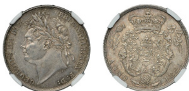
213 Shilling, 1821 (ESC 2396 [1247]; S 3810). Virtually mint state, lightly toned [slabbed NGC MS 63]