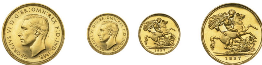
G 283 Proof Sovereign, 1937 (WR 439; S 4076). Edge bruise at 11 o'clock, otherwise about mint state, brilliant £2,000-£3,000