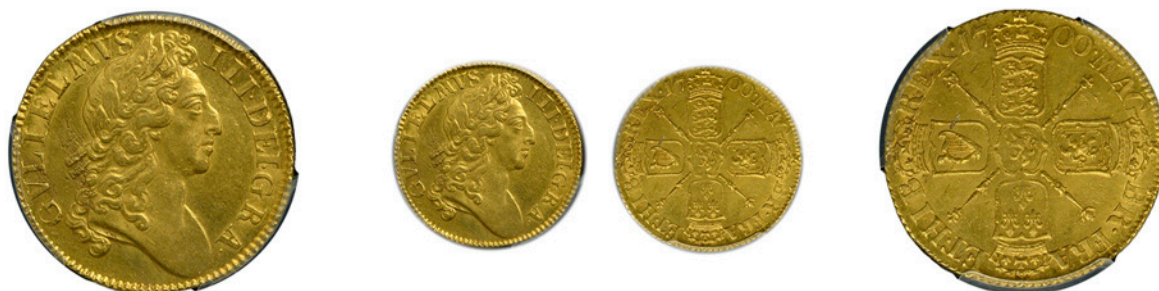
144 Guinea, 1700, second bust (MCE 184; S 3460). Some obverse haymarking, otherwise extremely fine or better [slabbed PCGS Genuine - Streak removed - Unc Detail]