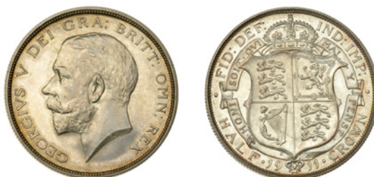
279 Proof Halfcrown, 1911 (ESC 3710 [758]; S 4011). A few light hairlines, otherwise practically as struck, brilliant £200-£260 Provenance: Bellamy Collection, DNW Auction 101, 21 June 2012, lot 508