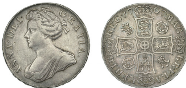
158 Crown, 1707, roses and plumes, edge SEXTO (ESC 1343 [102]; S 3578). Cleaned at one time but now re-toned, good very fine £400-£500