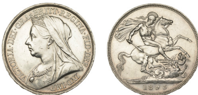
234 Crown, 1893, edge LVI (ESC 2593 [303]; S 3937). Of bright appearance, good extremely fine £180-£200