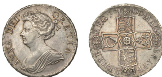
162 Halfcrown, 1709 plain, edge OCTAVO (ESC 1371 [579]; S 3604). Almost extremely fine, toned £400-£460