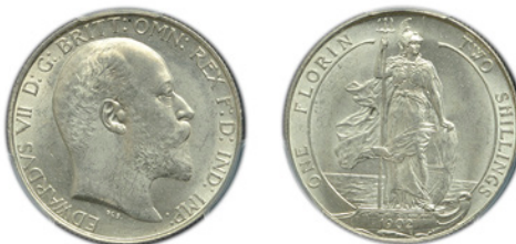
269 Florin, 1902 (ESC 3577 [919]; S 3981). Virtually mint state [slabbed PCGS MS 63] £150-£200