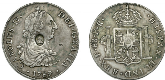
190 BOLIVIA, Charles IV, 8 Réales, 1789 PR , Potosí, obv. countermarked with head of George III in oval (ESC 1855 [131]; S 3765A). Coin and countermark very fine, but some lacquer in countermark £300-£400