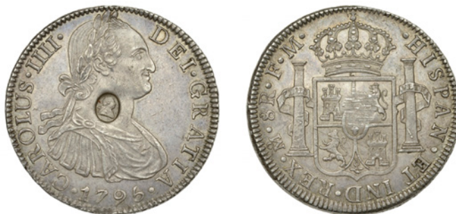
191 MEXICO, Charles III, 8 Réales, 1795 FM , Mexico City, obv. countermarked with head of George III in oval (ESC 1852 [129]; S 3765A). Coin and countermark extremely fine, attractive tone £1,000-£1,200