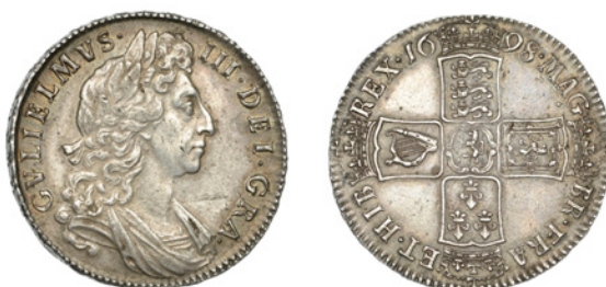
142 Halfcrown, 1698, edge DECIMO (ESC 1034 [554]; S 3494). Some flecking, otherwise about extremely fine and toned, traces of mint bloom £200-£260