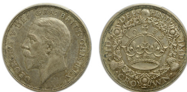
276 Crown, 1933 (ESC 3644 [373]; S 4036). Extremely fine or better [slabbed PCGS MS 63] £300-£400