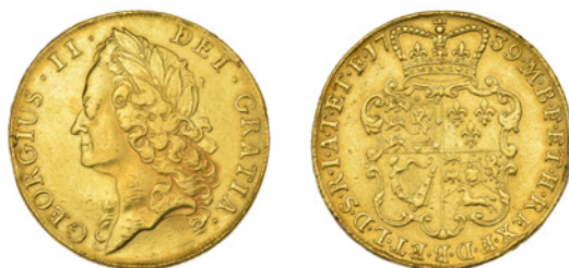
173 Two Guineas, 1739, intermediate head (MCE 293; S 3668). Has been removed from a mount and cleaned, otherwise nearly very fine