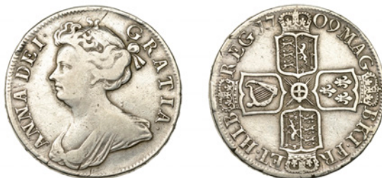
163 Halfcrown, 1709 plain, edge OCTAVO (ESC 1371 [579]; S 3604). Good fine, toned