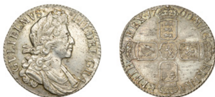
151 Shilling, 1700, fifth bust (ESC 1151 [1121A]; S 3516). Some light haymarking, otherwise, good extremely fine £300-£360