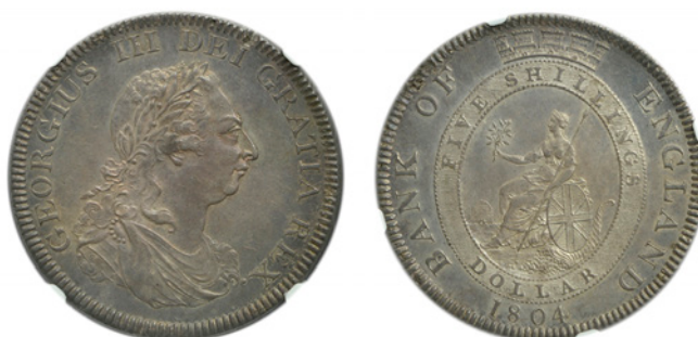
192 Dollar, 1804, types A/2, leaf to upright of E in DEI, pellet after REX (ESC 1925 [144]; S 3768). Extremely fine, toned [slabbed NGC AU 58] £600-£800