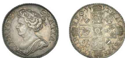
168 Shilling, 1712, fourth bust, roses and plumes (ESC 1410 [1159]; S 3617). Good very fine, toned