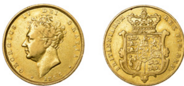
G 210 Sovereign, 1826 (M 11; S 3801). About very fine