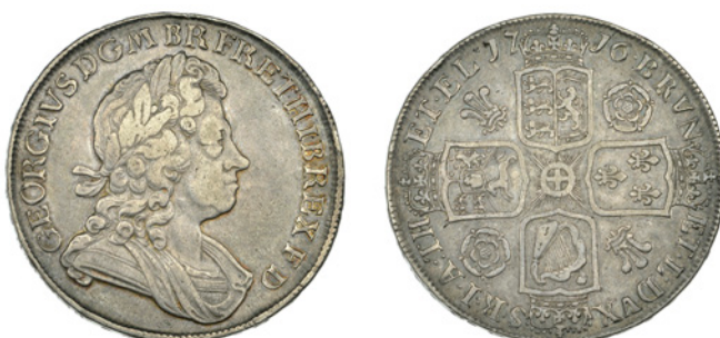
170 Crown, 1716, roses and plumes, edge SECVNDO (ESC 1540 [110]; S 3639). Very fine