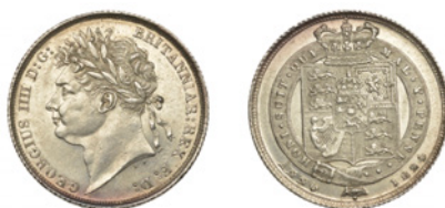
214 Shilling, 1824 (ESC 2400 [1251]; S 3811). Good extremely fine, lightly toned