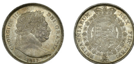
199 Halfcrown, 1817, large head (ESC 2090 [616]; S 3788). Extremely fine, toned