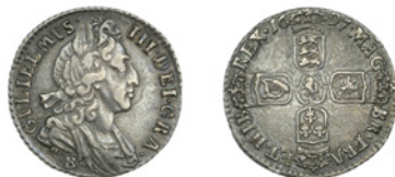
155 Sixpence, 1697 B , third bust (ESC 1266 [1568]; S 3539). Very fine, scarce £100-£120