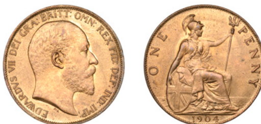
275 Penny, 1904 (F 159; BMC 2209; S 3990). Minor carbon spots on reverse, otherwise almost mint state, original colour £100-£150