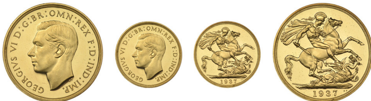
G 282 Proof Two Pounds, 1937 (WR 437; S 4075). Minor hairlines, otherwise about as struck, brilliant £1,500-£1,800