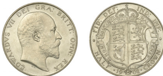
268 Proof Halfcrown, 1902 (ESC 3568 [747]; S 3980). About mint state, lightly toned £120-£150