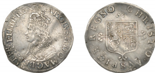
125 First issue, Shilling, mm. crown on obv. only, 5.86g/12h (ESC 272 [1010]; N 2762; S 3308). Creased and with a few small surface marks, otherwise very fine £800-£1,000