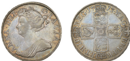
164 Halfcrown, 1713, plain, edge DVODECIMO (ESC 1376 [583]; S 3604). Good very fine, toned