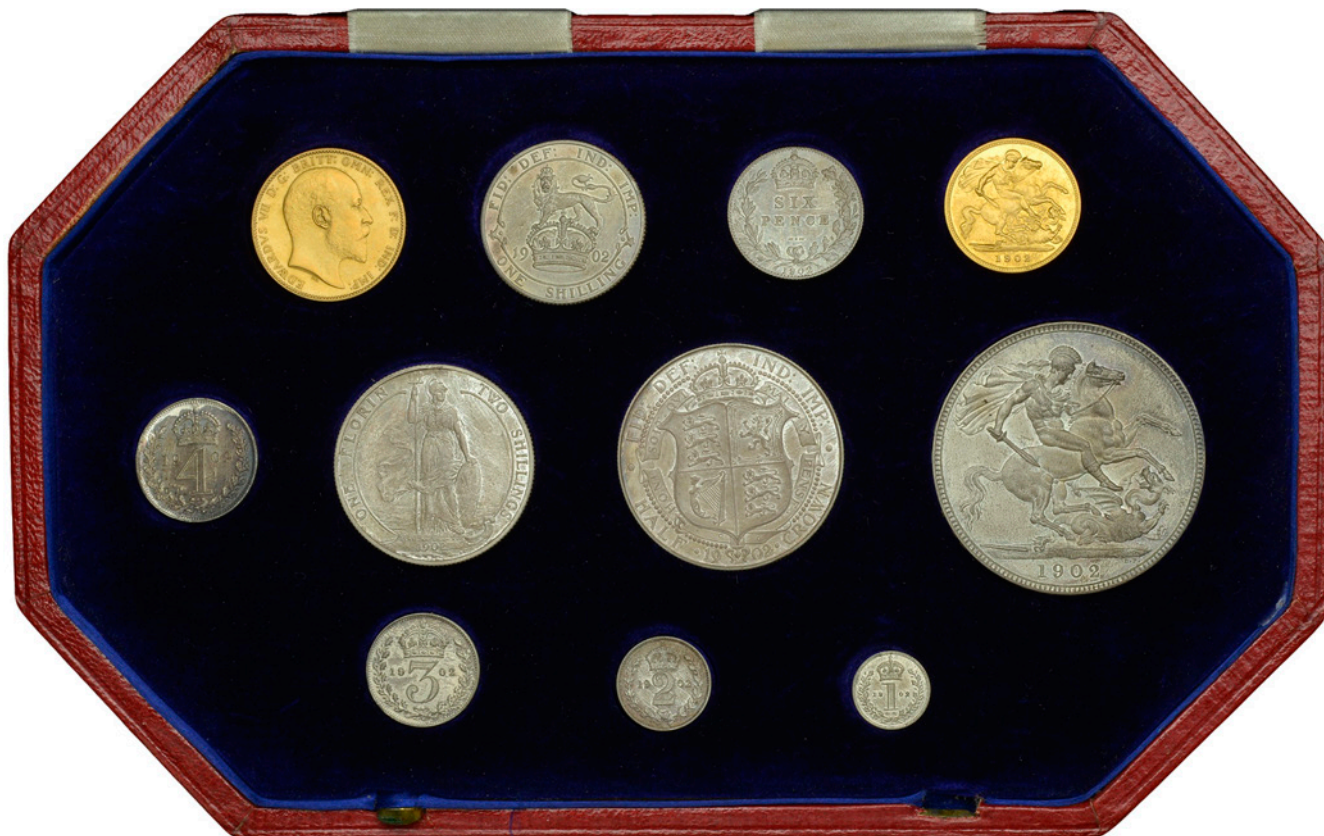
287 Proof set, 1902, comprising Sovereign and Half-Sovereign, Crown to Maundy Penny [11]. Matt, mostly about as struck; in official red case of issue £1,200-£1,500