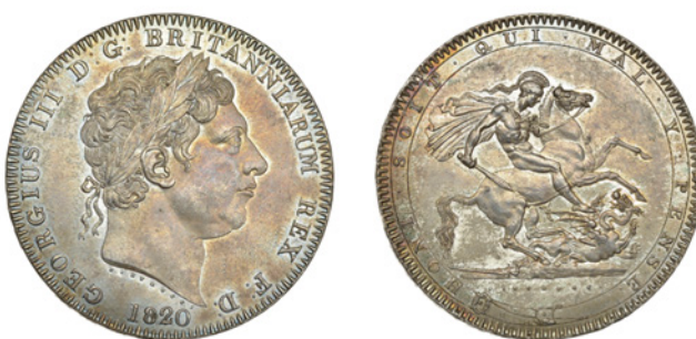
197 Crown, 1820, edge LX (ESC 2016 [219]; S 3787). About extremely fine with some toning and lustre