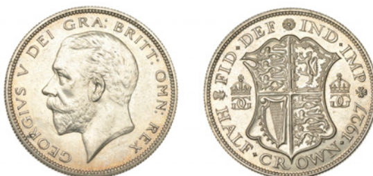
280 Proof Halfcrown, 1927 (ESC 3732 [776]; S 4037). Lightly hairlined, otherwise better than extremely fine £80-£100