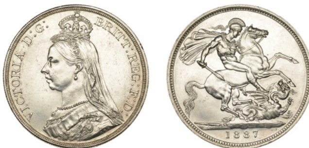
233 Crown, 1887 (ESC 2585 [296]; S 3921). Extremely fine £140-£180