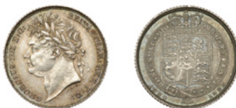
216 Sixpence, 1825 (ESC 2427 [1659]; S 3814). Almost as struck