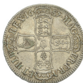
136 Crown, 1687, second bust, edge TERTIO (ESC 743 [78]; S 3407). Cleaned at one time, some discolouration, otherwise good fine, reverse better £200-£260