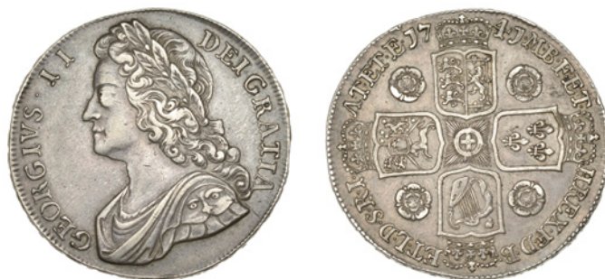
175 Crown, 1741, roses, edge DECIMO QVARTO (ESC 1666 [123]; S 3687). Very fine, toned