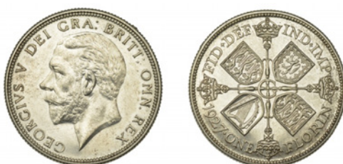
281 Proof Florin, 1927 (ESC 947; S 4038). Some hairlining, otherwise good extremely fine, fields brilliant £120-£150