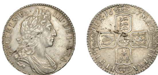
148 Halfcrown, 1697, edge NONO (ESC 1021 [541]; S 3487). Some flecking, otherwise good very fine, reverse better, lightly toned