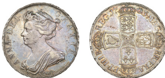
159 Halfcrown, 1703 VIGO , edge TERTIO (ESC 1358 [569]; S 3580). Some minor irregularities on rim, otherwise better than very fine, attractively toned £400-£500