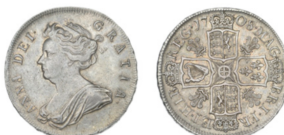
161 Halfcrown, 1708, plumes, edge SEPTIMO (ESC 1369 [578]; S 3606). Good very fine, attractive old cabinet tone £240-£300