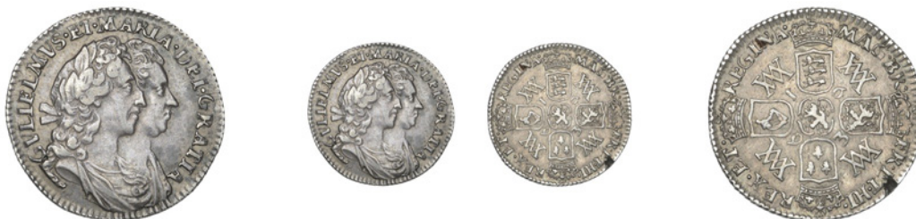
143 Sixpence, 1693 (ESC 869 [1529]; S 3438). Stain below chin, otherwise good very fine, toned