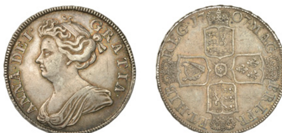
160 Halfcrown, 1707, edge SEPTIMO (ESC 1366 [574]; S 3604). Good very fine, toned £320-£360