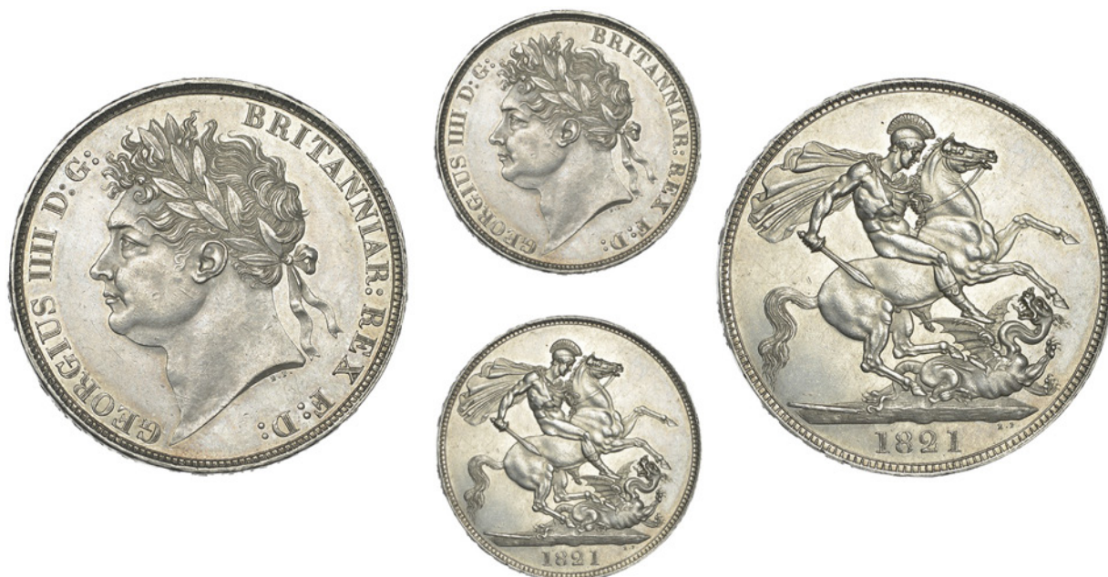
211 Crown, 1821, edge SECUNDO (ESC 2310 [246]; S 3805). Of bright appearance with minor surface marks, otherwise about as struck, proof-like fields