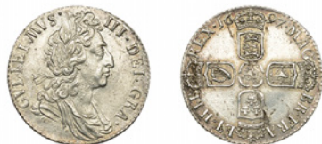
154 Sixpence, 1697, third bust, large crowns, ordinary harp, reads GVLEIMVS (ESC 1237 [1566C]; S 3538). Extremely fine, very rare £240-£280