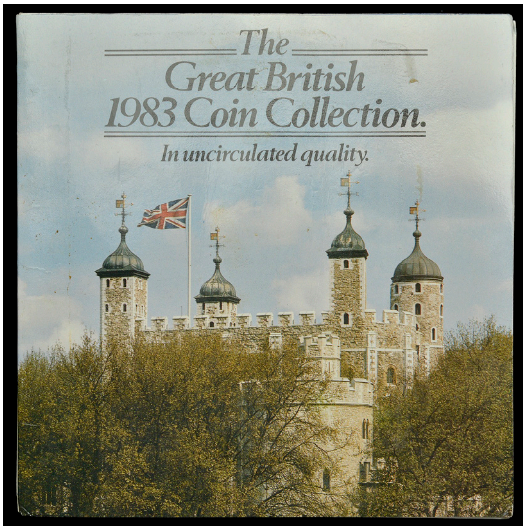
290 Specimen set, 1983, Martini issues, including the Twopence mule (S 4236A) [8]. As struck, the mule very rare; in folder of issue [this creased and stained on the front cover] £600-£800