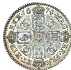
132 Sixpence, 1674 (ESC 566 [1512]; S 3382). Small scratch on obverse, otherwise nearly extremely fine, attractive iridescent tone £300-£360