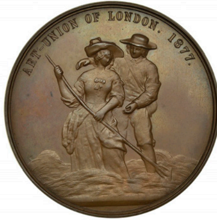
647 William Mulready , 1877, a copper medal by G.G. Adams for the Art Union of London, bust left, rev. detail from Mulready's painting The Haymakers , 56mm (BHM 3037; E 1657). About as struck, reflective fields £100-£120