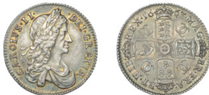
130 Shilling, 1663, first bust, harp with 5 strings (ESC 500 [1022]; S 3371). Very fine, reverse better, attractively toned £300-£400