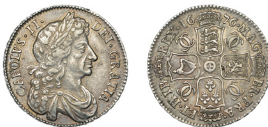
128 Halfcrown, 1676, fourth bust, edge VICESIMO OCTAVO (ESC 471 [478]; S 3367). Some small die flaws and clash marks, otherwise good very fine £400-£500 Provenance: M. Gietzelt Collection, DNW Auction 151, 14 November 2018, lot 12