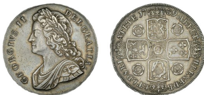
174 Crown, 1739, roses, edge DVODECIMO (ESC 1665 [122]; S 3687). Good very fine, toned