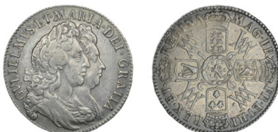
140 Halfcrown, 1692, edge QUARTO (ESC 853 [517]; S 3436). Very fine, reverse better, toned £440-£500