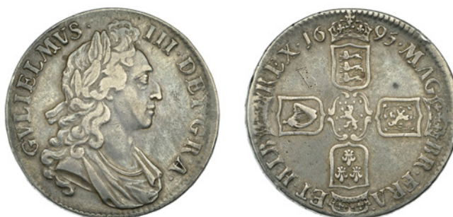
145 Crown, 1695, first bust, edge SEPTIMO (ESC 990 [86]; S 3470). A few minor marks, otherwise very fine