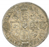
133 Sixpence, 1681 (ESC 577 [1520]; S 3382). Good very fine, reverse better £260-£300