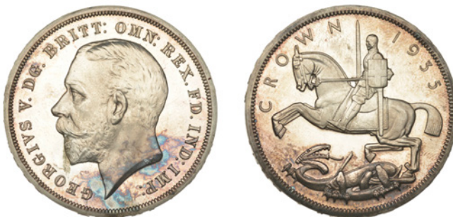
278 Proof Crown, 1935, edge raised xxv, 28.40g/12h (ESC 3655 [378]; S 4050). Minimal hairlines, otherwise about as struck; in red box of issue £500-£700