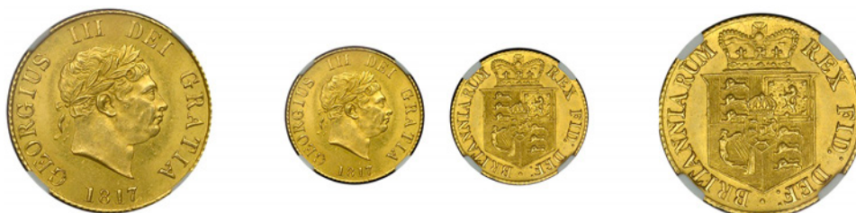
G 194 Half-Sovereign, 1817 (M 400; S 3786). About as struck [slabbed NGC MS 63] £1,200-£1,600