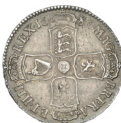
137 Halfcrown, 1686, first bust, edge SECUNDO (ESC 749 [494]; S 3408). About very fine £300-£400