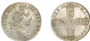
153 Sixpence, 1697, third bust, large crowns, ordinary harp, reads (ESC 1237 [1566C]; S 3538). About mint state £180-£200