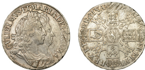
138 Crown, 1691, edge TERTIO (ESC 820 [82]; S 3433). Good very fine but some peripheral blank filing £1,000-£1,200