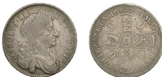
129 Halfcrown, 1683, fourth bust, edge TRICESIMO QUINTO (ESC 497 [490]; S 3367). About very fine, scarce £200-£260