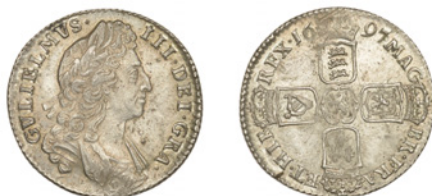
150 Shilling, 1697, third bust (ESC 1128 [1102]; S 3505). Good extremely fine £300-£400