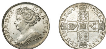
x 166 Shilling, 1707, third bust (ESC 1395 [1141]; S 3610). Bright appearance, some light flan flecking, otherwise extremely fine