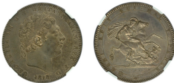
195 Crown, 1818, edge LVIII (ESC 2005 [211]; S 3787). About mint state [slabbed NGC MS 62]