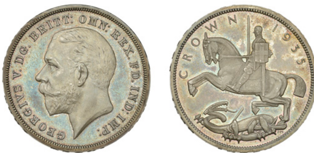
277 Proof Crown, 1935, edge raised xxv, 28.43g/12h (ESC 3655 [378]; S 4050). Very minor surface marks, otherwise virtually as struck, toned; in case of issue, "lan" in ink on top £500-£600