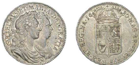
139 Halfcrown, 1689, second shield, caul only frosted, pearls, edge PRIMO (ESC 839 [510]; S 3435). Good very fine, traces of mint bloom £400-£500 Provenance: B.J. Dawson Collection, DNW Auction 157, 21 March 2019, lot 134