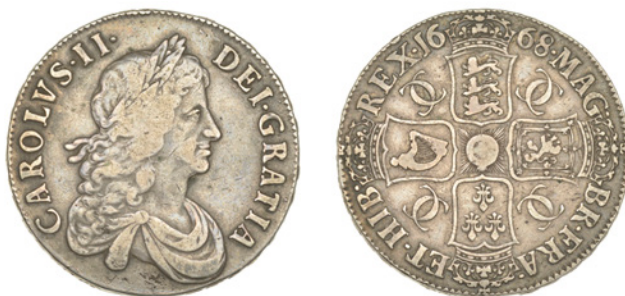
126 Crown, 1668, second bust, edge VICESIMO (ESC 373 [36]; S 3357). About very fine £240-£300