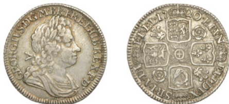
171 Shilling, 1720, roses and plumes (ESC 1568 [1167]; S 3645). Very fine, scarce