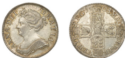
167 Shilling, 1708, third bust, plain (ESC 1399 [1147]; S 3610). Good extremely fine