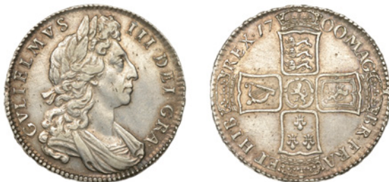
149 Halfcrown, 1700, edge DVODECIMO (ESC 1043 [561]; S 3494). A few minor marks, otherwise about extremely fine £240-£300