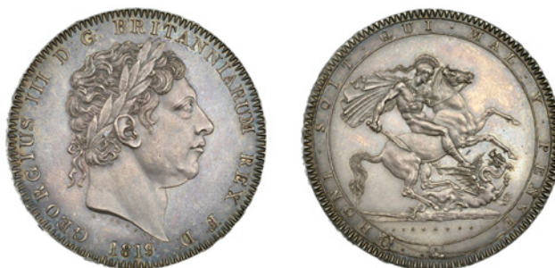
196 Crown, 1819, edge LX (ESC 2013 [216]; S 3787). Good extremely fine and toned, reflective fields