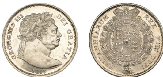
198 Halfcrown, 1817, large head (ESC 2090 [616]; S 3788). About mint state