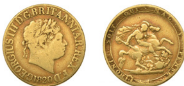
G 193 Sovereign, 1820, short date (M 4A; S 3785C). About fine, rare £400-£500