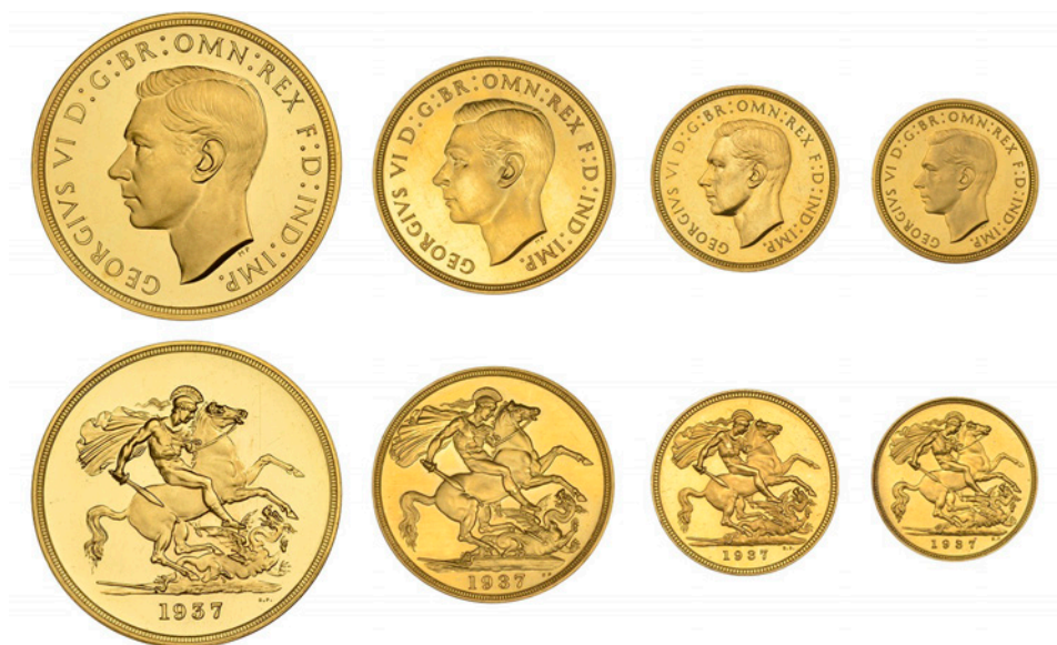
G 289 Proof set, 1937, comprising Five and Two Pounds, Sovereign and Half-Sovereign [4]. Sovereign with minor hairlines, otherwise almost as struck; in official case of issue £8,000-£10,000