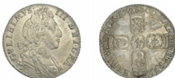
157 Sixpence, 1700, third bust (ESC 1250 [1579]; S 3538). Lightly brushed on obverse, otherwise better than extremely fine £180-£220