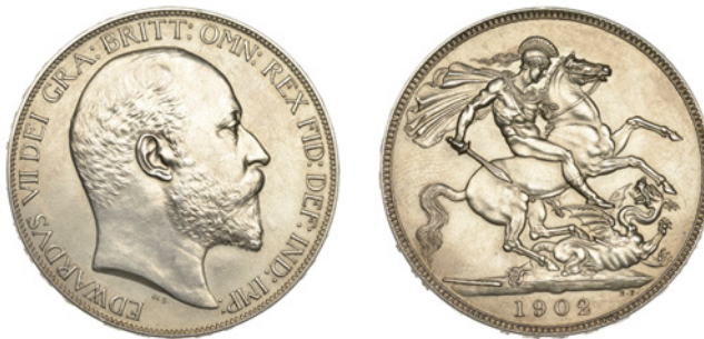
267 Proof Crown, 1902, edge II (ESC 3562 [362]; S 3979). Good extremely fine, but obverse previously cleaned £150-£180