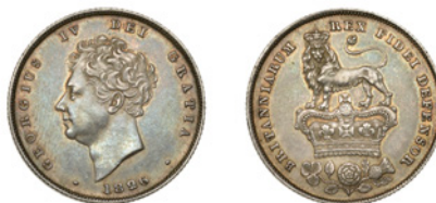
215 Shilling, 1826 (ESC 2409 [1257]; S 3812). Nearly extremely fine, toned