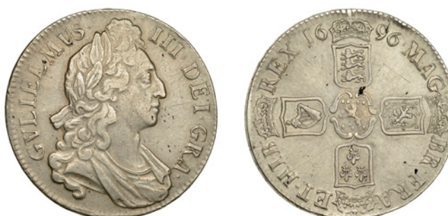
147 Crown, 1696, first bust, edge OCTAVO (ESC 995 [89]; S 3470). Good very fine