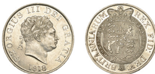
200 Halfcrown, 1818 (ESC 2099 [621]; S 3789). Almost as struck