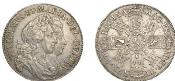
141 Halfcrown, 1693/3 inverted, edge QUINTO, F of FR over E (ESC 859 [521 var.]; S 3436). Minor flecking, otherwise very fine £340-£400