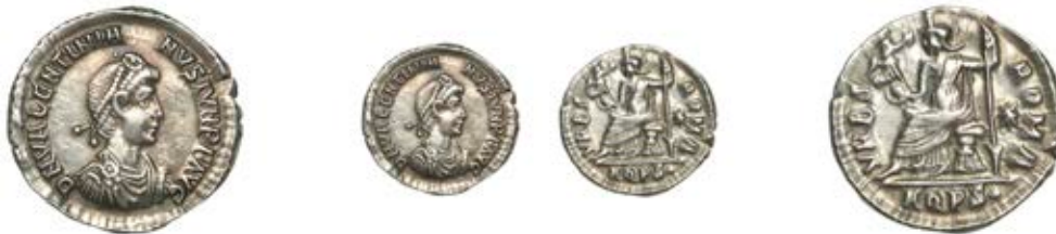
420 Valentinian II , Siliqua, Aquileia, c. 375-8, pearl-diademed and cuirassed bust right, rev. Roma seated right on cuirass, holding victory and sceptre, star behind, 2.04g (RIC 15d; RSC 76h). Good very fine, toned £80-£100