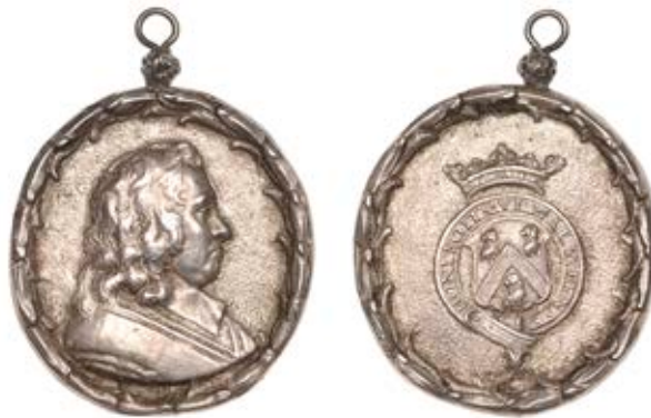
723 General George Monck, 1660 , an electrotype of a silver badge after A. Simon, bust right, rev. arms within crowned garter, wreath borders on both sides, 48 x 35mm, 28.43g (cf. Platt type D; MI I, 466/64). Very fine; with loop for suspension £100-£150 Provenance: J. Webb Collection