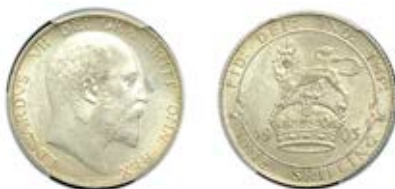
160 Shilling, 1905 (ESC 3591 [1414]; S 3982). Good extremely fine, very rare [slabbed PCGS MS 63] £2,400-£3,000