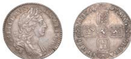
75 Shilling, 1697, first bust (ESC 1117 [1091]; S 3497). Minor bagmarking, otherwise about extremely fine, toned £150-£180 Provenance: St James's Auction 2, 11 May 2005, lot 242