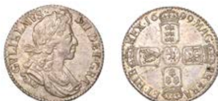
76 Shilling, 1699, fifth bust (ESC 1147 [1117]; S 3516). Extremely fine and toned, scarce £800-£1,000