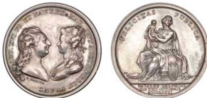
790 Birth of the Dauphin (Prince Louis Joseph), 1781 , a silver medal by B. Duvivier, facing busts of Louis XVI and Marie Antoinette, rev. seated female figure holding the infant prince, 42mm, 38.88g (BDM I, 686). About extremely fine, toned £150-£180

Prince Louis Joseph , first son of Louis XVI and Marie Antoinette, died of tuberculosis in 1789, aged 7