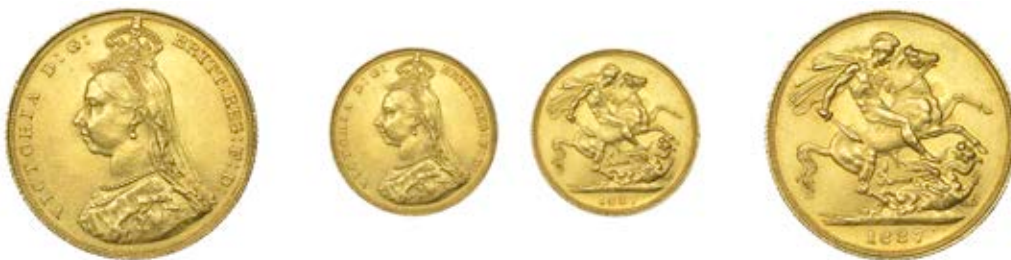
G 124 Sovereign, 1887, Jubilee (M 138; S 3866). About as struck