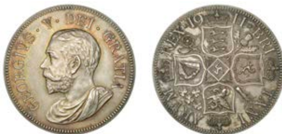
166 Pattern Double-Florin or Four Shillings, 1911, by R. Huth, in silver, bust left, rev. cruciform shields, Roman 1s in date, edge plain, 22.68g/12h (L & S 18; ESC 3677). Good extremely fine, matt with patchy toning, rare £2,400-£3,000