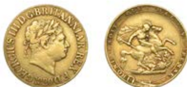
G 105 Sovereign, 1820, closed 2 (M 4B; S 3785C). Possibly removed from a mount, otherwise about very fine, rare £500-£600