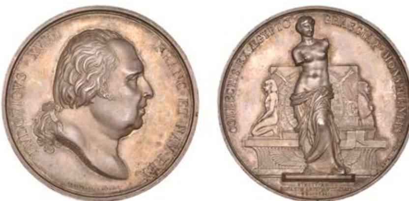
803 Collections of Greek and Egyptian Art , 1822, a silver medal by B. Andrieu and A.J. Depaulis, bust of Louis XVIII right, rev. the Venus de Milo, Egyptian monument behind, 51mm (BDM I, 557). Light scratch in obverse field, otherwise extremely fine, rare £400-£500