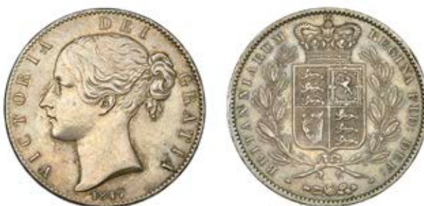
128 Crown, 1847, edge xi (ESC 2567 [286]; S 3882). Previously cleaned and now re-toning, otherwise very fine £150-£180