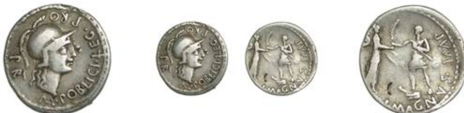
522 POMPEIANS, Cnæus Pompeius , Denarius, uncertain Spanish mint, 46-5, helmeted head of Athena right, rev. Hispania standing right, shield slung on back and holding two spears, handing palm frond to Pompeian soldier standing on ship prow, 3.66g (Craw. 469/1a; RSC Pompey the Great 1). A few small banker's marks, otherwise about very fine £100-£120