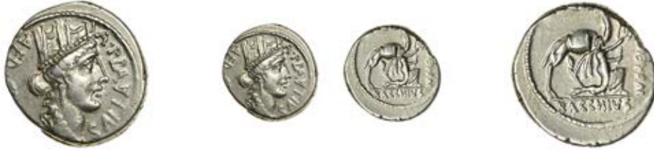
503 A. Plautius , Denarius, c. 55, turreted head of Cybele left, rev. Bacchus kneeling right extending olive-branch, camel behind, 4.08g (Craw. 431/1; BMCRR 3916; RSC Plautia 13). Very fine £100-£120