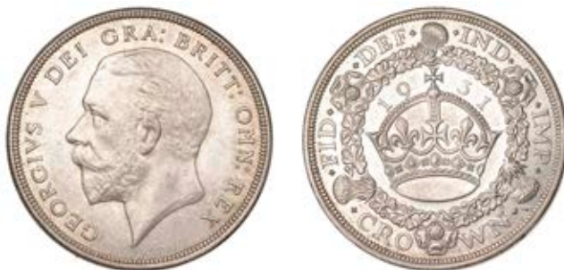
164 Crown, 1931 (ESC 3639 [371]; S 4036). Some minor surface marks, otherwise better than extremely fine, toned £200-£260