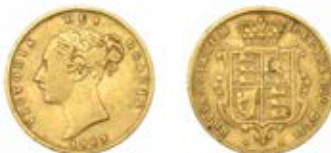
G 125 Half-Sovereign, 1863, no die no. (M 438; S 3859A). Fine