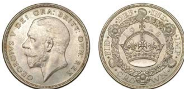
x 163 Crown, 1928 (ESC 3633 [368]; S 4036). Extremely fine £200-£260