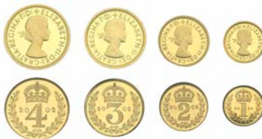
G 187 Proof Maundy set, 2002, in gold (S 4211) [4]. Brilliant, rare