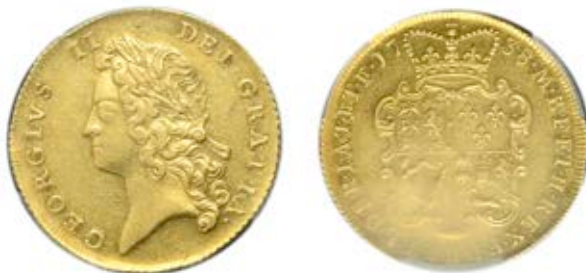
97 Two Guineas, 1738 (MCE 291; S 3667B). Good very fine [slabbed PCGS AU 50]