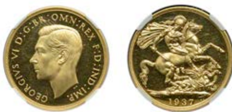
G 175 Proof Two Pounds, 1937 (WR 437; S 4075). About as struck [slabbed NGC PF 65]