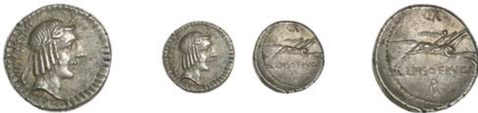
472 L. Piso Frugi , Denarius, Rome c. 90, xxxvi, laureate head of Apollo right, control mark behind head, rev. horseman right, monogram in exergue, 3.92g (Craw. 340/1; BMCRR 1938ff; RSC Calpurnia 11). Extremely fine, toned £80-£100 Provenance: Naville Auction 8 (Geneva), 6 July 2014, lot 102