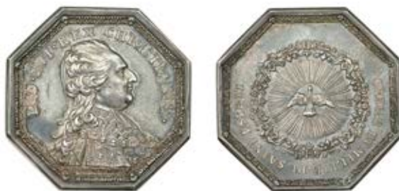
789 Order of the Holy Spirit , an octagonal silver jeton by N. Gatteaux, undated [c. 1780], bust of Louis XVI right, rev. Order of the Holy Spirit, 34mm, 16.71g. About extremely fine and toned, rare £100-£120