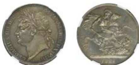
112 Crown, 1821, edge SECUNDO (ESC 2310 [246]; S 3805). Good extremely fine, attractively toned [slabbed NGC MS 62]