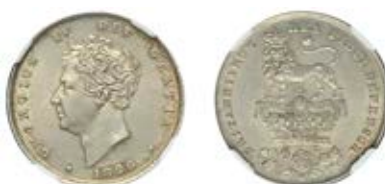
113 Shilling, 1826 (ESC 2409 [1257]; S 3812). About as struck, lightly toned with residual mint bloom [slabbed NGC MS 63]