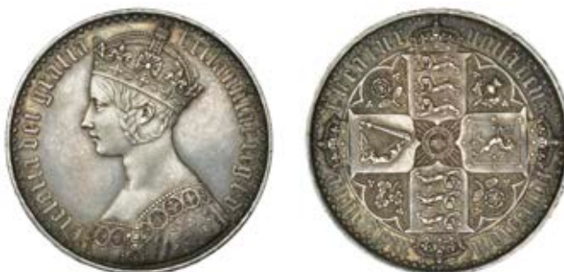
129 'Gothic' Crown, 1847, edge UNDECIMO (ESC 2571 [288]; S 3883). Nearly extremely fine