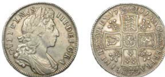
74 Halfcrown, 1701, plumes, edge DECIMO TERTIO (ESC 1052 [567]; S 3496). About very fine, reverse better, scarce £600-£800