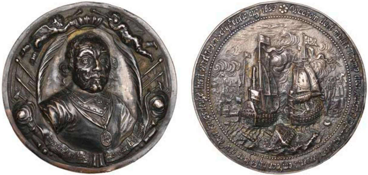
722 Death of Admiral Martin Tromp, 1653 , a cast silver medal by W. Müller, armoured bust facing, two cherubs above holding crown, rev. naval engagement, sinking ship in foreground, 75mm, 68.66g (MI I, 403/34; E 186a). Hole in truncation of shoulder, otherwise good very fine, dark tone £500-£700