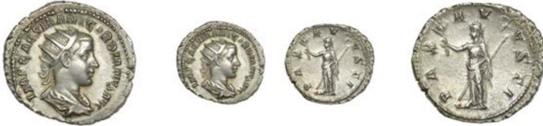
368 Gordian III , Antoninianus, Rome, 238-9, radiate and draped bust right, rev. Pax standing left, holding branch and sceptre, 3.81g (RIC 3; RSC 173). Nearly extremely fine, lightly toned £60-£80