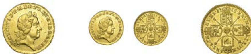
93 Quarter-Guinea, 1718 (MCE 277; S 3638). A few minor surface marks, otherwise good very fine, reverse a little better £240-£300