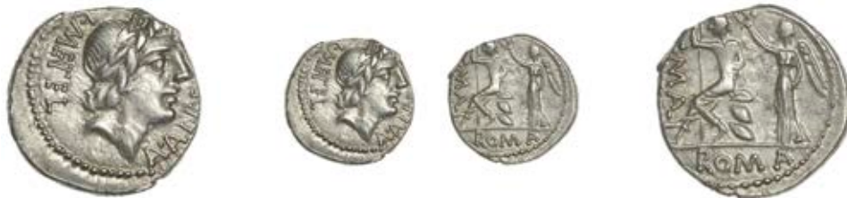
470 L. Cæcilius Metellus and C. Publicius Malleolus , Denarius, Rome, c. 96, laureate head of Apollo right, rev. Roma seated left on pile of arms, leaning on spear, crowned from behind by Victory, 3.91g (Craw. 335/1a; BMCRR 724; RSC Cæcilia 45). Struck from blunt dies, otherwise extremely fine £100-£120