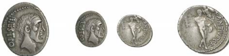
508 C. Antius Restio , Denarius, Rome, c. 47, bust right, rev. Hercules walking right, holding trophy and club, 3.43g (Craw. 455/1a; RSC Antia 1). Very fine, toned, rare £80-£100 Provenance: Naville Auction 11 (Geneva), 30 November 2014, lot 170