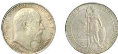
159 Florin, 1902 (ESC 3577 [919]; S 3981). Virtually mint state [slabbed PCGS MS 63] £150-£180