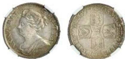
91 Shilling, 1708, third bust, plain (ESC 1399 [1147]; S 3610). Virtually mint state, lightly toned [slabbed NGC MS 64] £500-£600