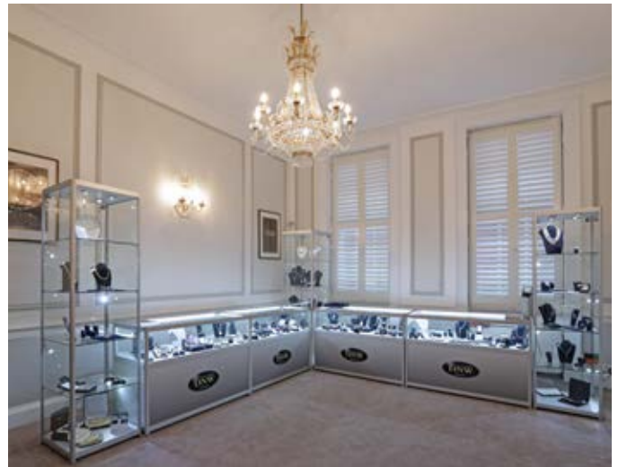
Jewellery viewing room

We hold over 20 auctions each year, the full contents of which are published on the internet around one month before the sale date, together with a unique preview facility which is available as lots are catalogued and photographed. Printed auction catalogues are published three weeks prior to each sale.