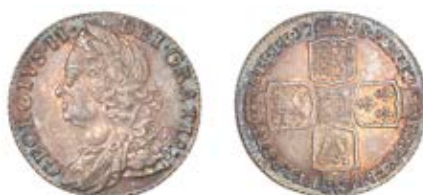
102 Shilling, 1758 (ESC 1734 [1213]; S 3704). Extremely fine, attractively toned