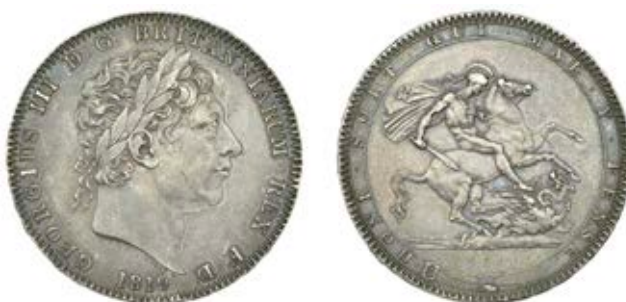
107 Crown, 1819, edge ux, no stops on edge (ESC 2011 [215A]; S 3787). Very fine and toned, very rare £240-£300