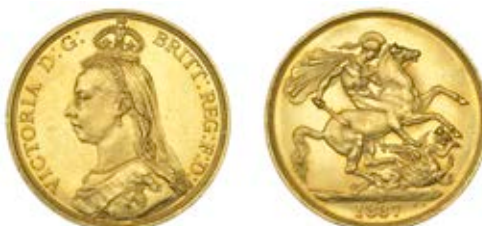
G 117 Two Pounds, 1887 (S 3865). About as struck £1,000-£1,200