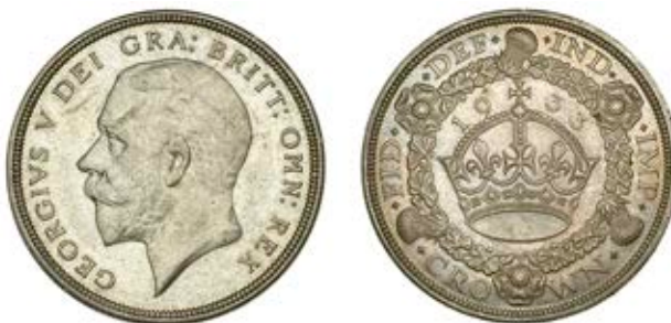
165 Crown, 1933 (ESC 3644 [373]; S 4036). A few light surface marks, otherwise good extremely fine £240-£300