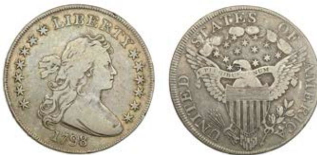
674 Dollar, 1798, draped bust, heraldic eagle. Good fine