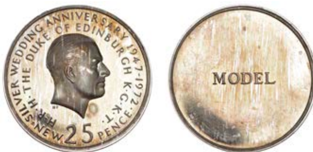
186 25 New Pence, 1972, a trial strike in silver by T.H. Paget, similar, edge plain, lower rims, 39mm, 30.78g/12h (Bruce TS1). Virtually as struck, attractively toned, rare £240-£300