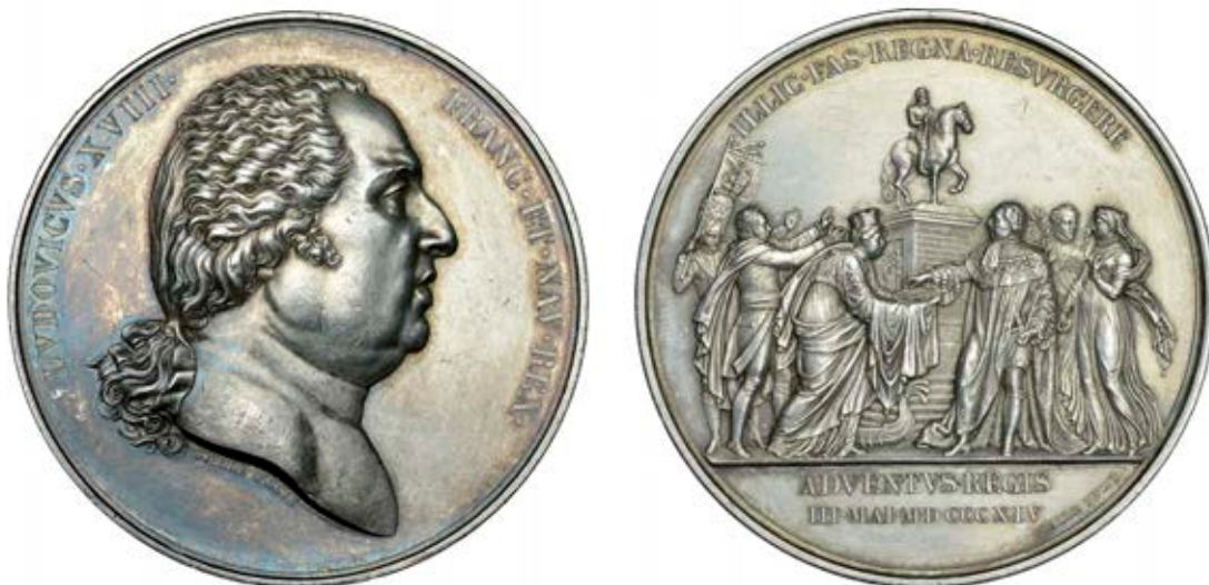
797 Entry of Louis XVIII into Paris , 1814, a silver medal by A. Galle, bust right, rev. Paris offering Louis the keys to the city, 68mm (Bramsen 1409). Fields brushed, otherwise about extremely fine with some toning, very rare in silver £400-£500