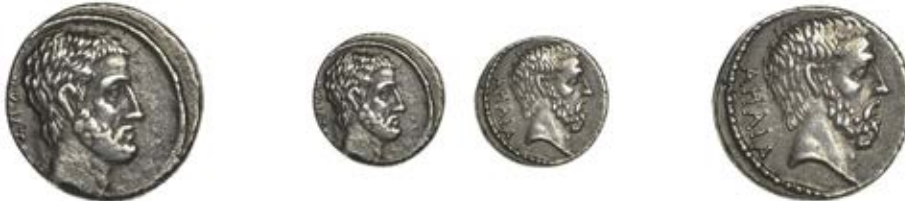
505 Marcus Brutus , Denarius, Rome, c. 54, bust of L. Junius Brutus right, rev. bust of C. Servilius Ahala right, 4.00g (Craw. 433/2; BMCRR 3864; RSC Junia 30). A few faint scratches, otherwise very fine, toned £200-£260