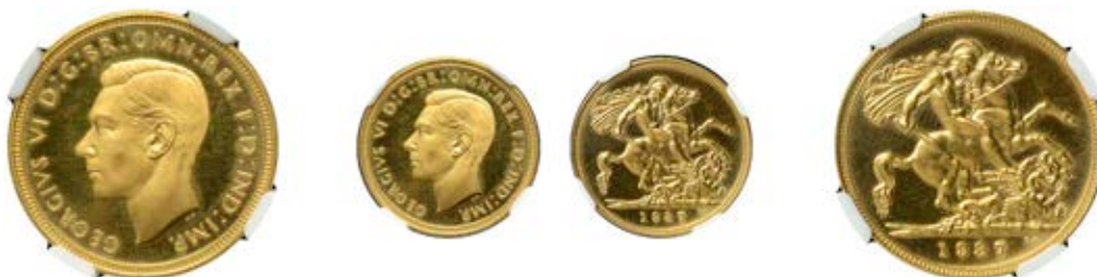
G 176 Proof Sovereign, 1937 (WR 439; S 4076). Brilliant, virtually as struck [slabbed NGC PF64+ star]