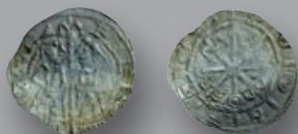
27 Stephen and Matilda , Penny, York, Phase 6, Two Figure type, two figures holding sceptre, rev. cross fleury, ornaments in legend, 1.20g (Allen, NC 2016, dies unlisted; Mack 220; cf. BMC 261-3; N 922; S 1315). Very fine and very rare £10,000-£15,000

Provenance: Found near Lincoln (Lincolnshire), 2017 (EMC 2017.0348)