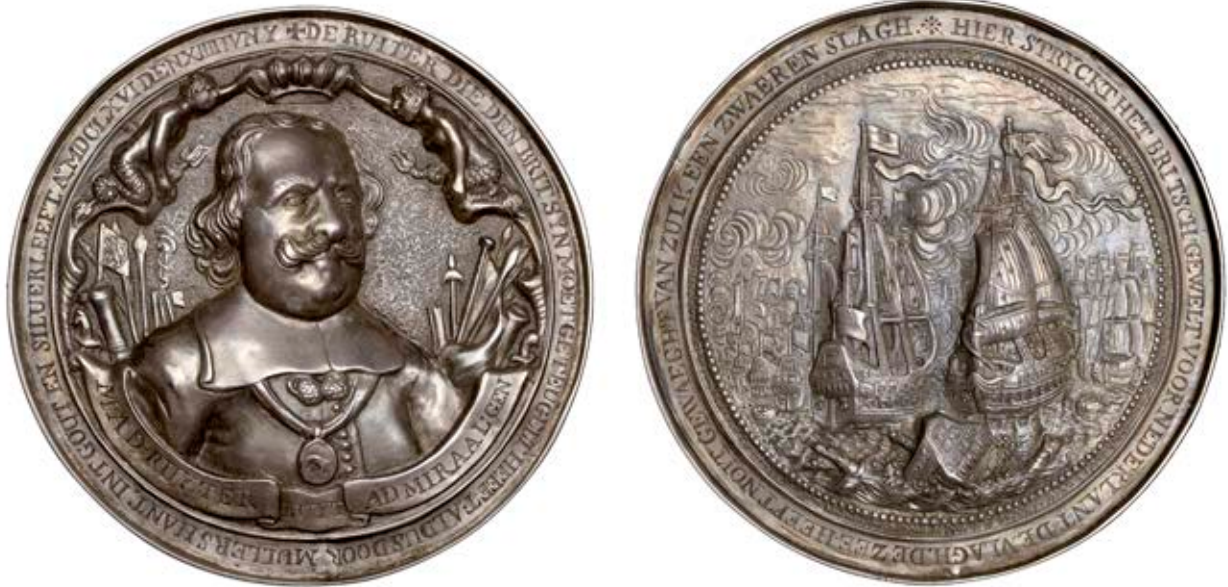
725 Admiral de Ruyter , 1666, a silver medal by W. Müller, formed of two cast plates joined by a broad rim, armoured bust facing, two figures above holding crown, rev. naval engagement, sinking ship in foreground, 76mm, 101.56g (MI I, 522/168; E 237). Extremely fine, very rare £1,000-£1,200