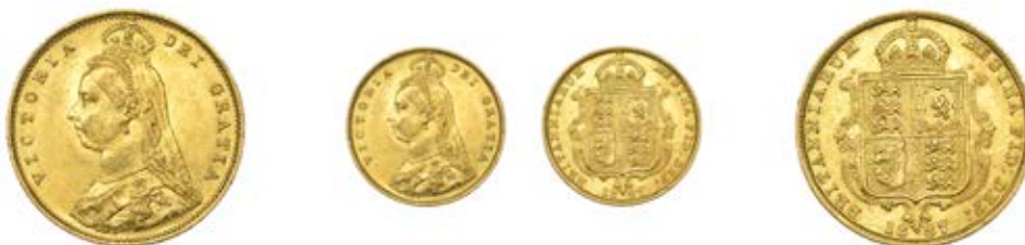
G 127 Half-Sovereign, 1887, Jubilee (M 478; S 3869). About as struck