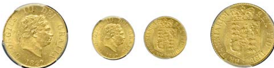
G 106 Half-Sovereign, 1820 (M 402; S 3786). Some light surface marks, otherwise good extremely fine [slabbed PCGS MS 62] £1,000-£1,500