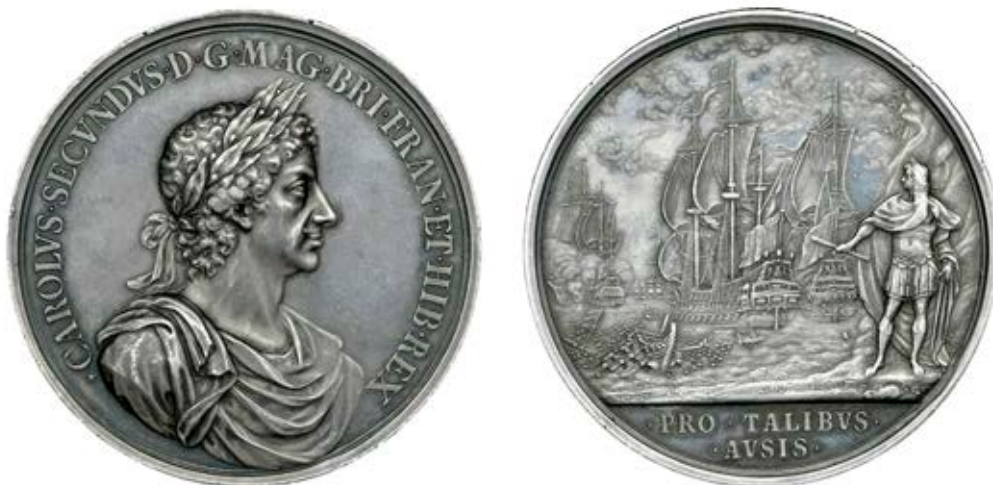
724 Battle of Lowestoft, 1665 , a silver medal, unsigned [by J. Roettiers], laureate and draped bust of Charles II right, rev. King dressed as a Roman general standing at right, watching battle from the shore, 63mm, 92.17g (MI I, 503/139; E 230). A few small rim nicks, otherwise extremely fine and toned £1,200-£1,500 Provenance: Spink Auction 210, 6-7 October 2011, lot 569