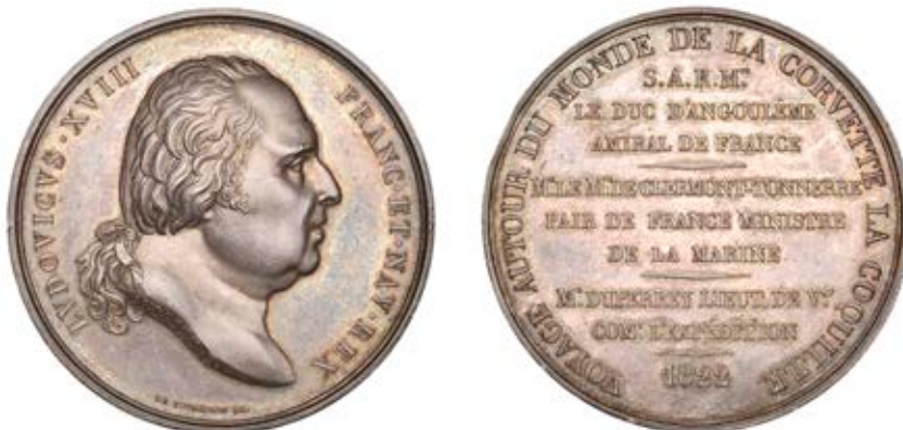
802 Voyage of La Coquille , 1822, a silver medal by B. Andrieu, bust of Louis XVIII right, rev. legend and date in nine lines, 51mm. Extremely fine and toned, rare £600-£800 The French naval vessel La Coquille completed a circumnavigation of the globe from 1822-5 under the command of Louis Duperrey, with Jules Dumont d'Urville as second-in-command. Later renamed L'Astrolabe , the ship completed two further voyages of exploration under the command of Dumont d'Urville, the second of which included a visit to Antarctica in 1837-8