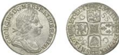
95 Shilling, 1723 ss c, first bust (ESC 1586 [1176]; S 3647). About as struck £400-£500