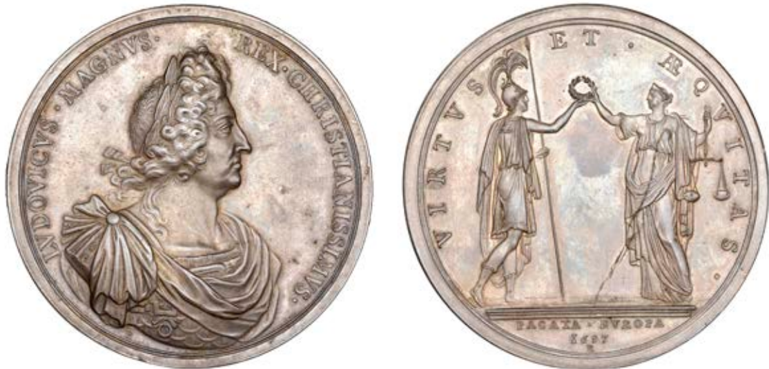
735 Treaty of Ryswick , 1697, a silver medal by J. Roussel, laureate and draped bust of Louis XIV right, rev. VIRTUS ET AEQVITAS, Mars and Justice standing, both holding wreath, 69mm, 157.09g (MI II, 177/468; Pax –; Divo 272). Extremely fine and very rare £2,000-£2,600