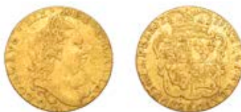
103 Half-Guinea, 1775, fourth bust (MCE 418; S 3734). Scratch before face and through shield on reverse, otherwise good fine £240-£300