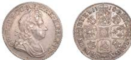
94 Shilling, 1718, roses and plumes (ESC 1566 [1165]; S 3645). Small flan flaw in reverse legend, otherwise about extremely fine, toned £300-£400