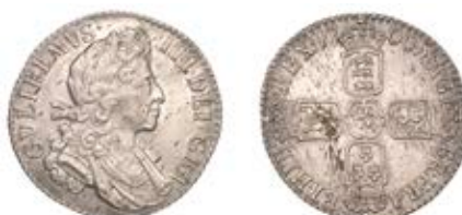
77 Shilling, 1700, fifth bust (ESC 1150 [1121]; S 3516). Cleaned, minor flecking, otherwise extremely fine £200-£260