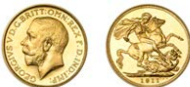
G 162 Proof Sovereign, 1911 (WR 416; M 213A; S 3996). Virtually as struck, scarce £1,500-£1,800