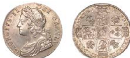
100 Shilling, 1736, roses and plumes (ESC 1709 [1199]; S 3700). Lightly cleaned, otherwise about extremely fine £340-£400