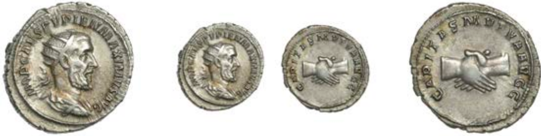
367 Pupienus , Antoninianus, Rome, 238, radiate and draped bust right, rev. clasped hands, 4.49g (RIC 10b; RSC 3). Very fine £200-£260