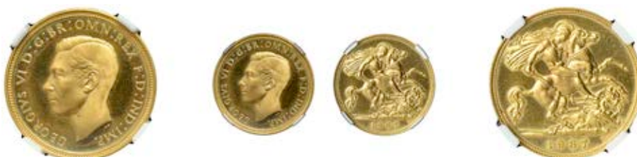
G 178 Proof Half-Sovereign, 1937 (WR 442; S 4077). Brilliant, virtually as struck [slabbed NGC PF66 star]