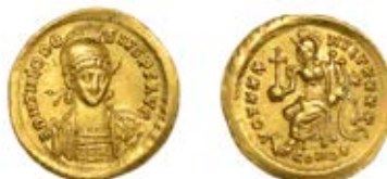
424 Theodosius II , Solidus, Constantinople, c. 430-40, D N THEODOSIVS P F AVG, helmeted and cuirassed bust facing, resting transverse spear on shoulder, rev. VOT XXX MVLT XXX, Constantinopolis seated left, feet resting on ship prow, holding sceptre and cross on globe, officiana r, CONOB in exergue, 4.44g (RIC X, 257). About very fine £200-£260