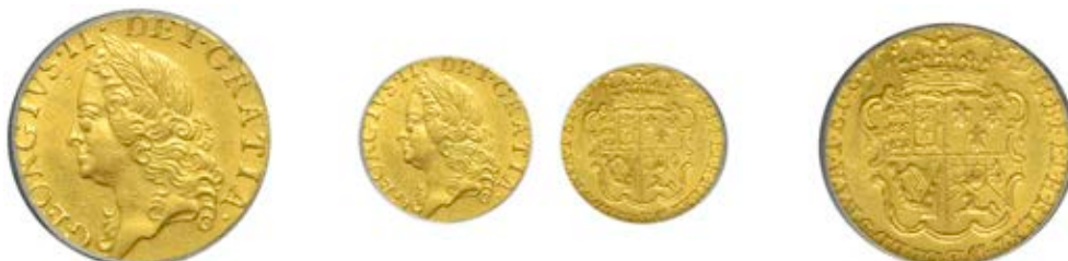
98 Half-Guinea, 1759 (MCE 365; S 3685). Good very fine [slabbed CGS EF 70]