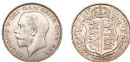
167 Halfcrown, 1925 (ESC 3727 [772]; S 4021A). Good very fine, scarce £150-£180 Provenance: DNW Auction 135, 24 March 2016, lot 834