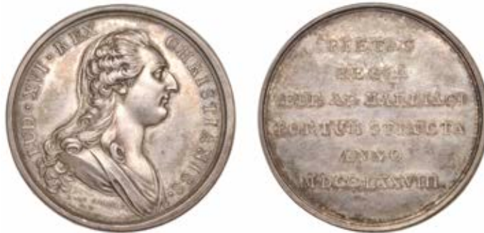
788 Church at Port-Marly, 1778 , a silver medal by B. Duvivier, draped bust of Louis XVI right, rev. legend and date in six lines, 42mm, 30.22g. Rims filed, otherwise extremely fine £200-£260