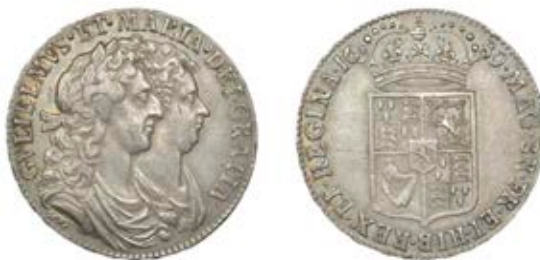
72 Halfcrown, 1689, second shield, no frosting, no pearls, edge PRIMO (ESC 846 [512]; S 3435). Some minor marks, otherwise about extremely fine and toned £800-£1,000