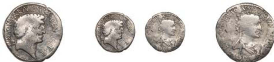
525 SECOND TRIUMVIRATE, Mark Antony and Cleopatra , Denarius, Alexandria, 34, bare head of Antony right, Armenian tiara behind, rev. draped bust of Cleopatra right wearing diadem, 3.44g (Craw. 543/1; BMCRR East 179; CRI 345; RSC 1). Good fine, both portraits clear and legends legible £2,000-£2,600