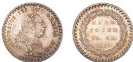
104 Bank of England, Eighteen Pence, 1811 (ESC 2112 [969]; S 3771). Extremely fine, toned £100-£120