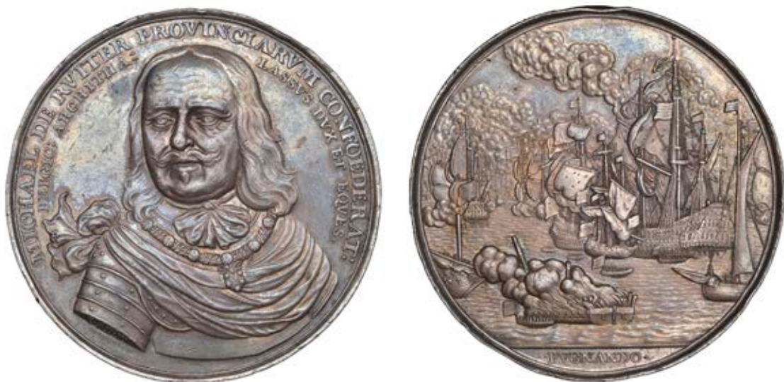
726 Admiral de Ruyter , 1666, a silver medal by C. Adolfszoon, armoured and draped bust facing, rev. naval engagement, burning ship in foreground, 70mm, 106.17g (MI I, 522/169; E 238). Small edge bruise at top and other minor marks, otherwise about extremely fine and toned, rare £1,000-£1,200