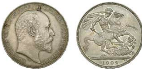
157 Proof Crown, 1902, edge II (ESC 3562 [362]; S 3979). Good extremely fine, but with small stain on obverse £200-£300