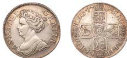
92 Shilling, 1711, fourth bust (ESC 1408 [1158]; S 3618). Cleaned, otherwise about extremely fine £150-£180