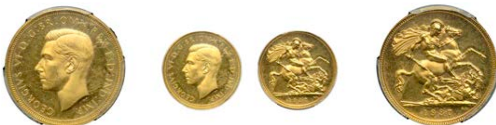
G 177 Proof Sovereign, 1937 (WR 439; S 4076). About mint state, brilliant [slabbed PCGS PR 64]