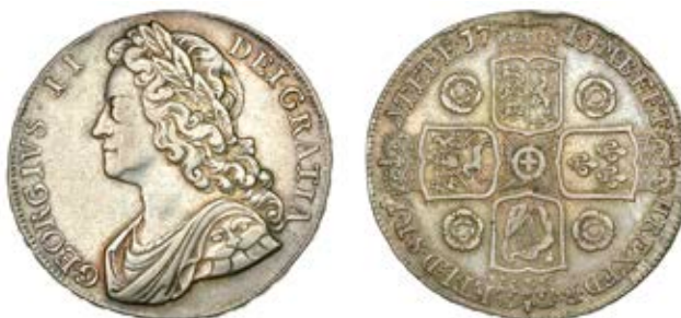
99 Crown, 1741, roses, edge DECIMO QVARTO (ESC 1666 [123]; S 3687). Very fine