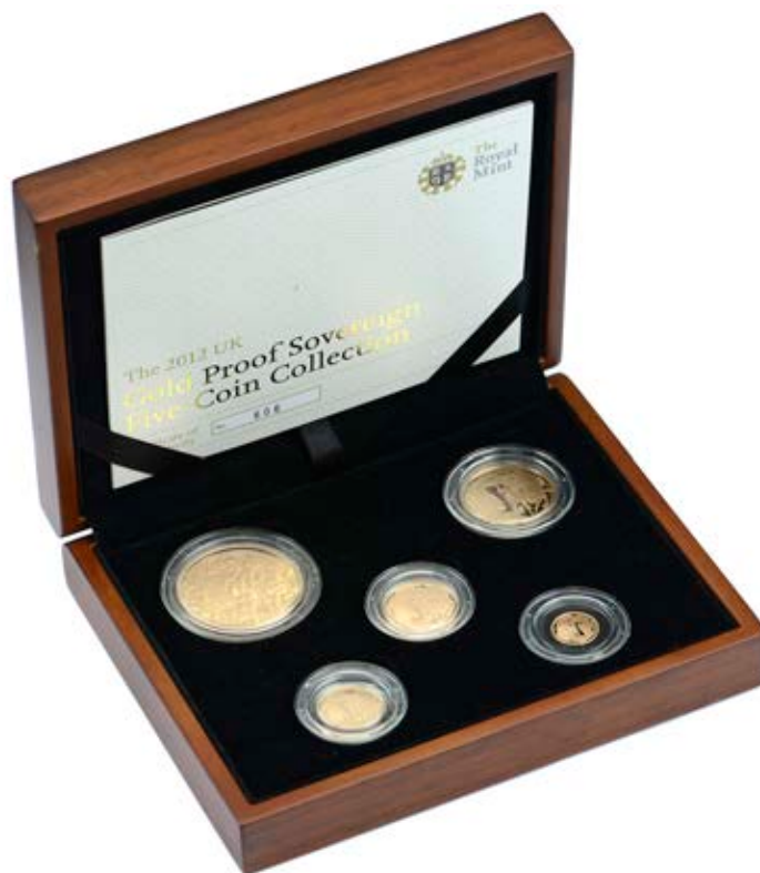
G 188 Proof set, 2012, comprising gold Five Pounds, Two Pounds, Sovereign, Half-Sovereign and Quarter-Sovereign [5]. Brilliant; in case of issue with certificate £4,000-£4,600