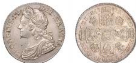
101 Shilling, 1737, roses and plumes (ESC 1711 [1200]; S 3700). Virtually mint state with light attractive toning £700-£900