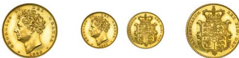
G 111 Proof Half-Sovereign, 1826, edge grained, wnr/6h (WR 249; S 3804). Some surface marks and hairlines, otherwise good extremely fine