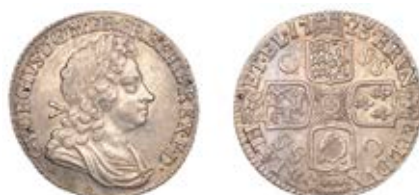
96 Shilling, 1723 ss c, first bust (ESC 1586 [1176]; S 3647). About extremely fine, toned £200-£260