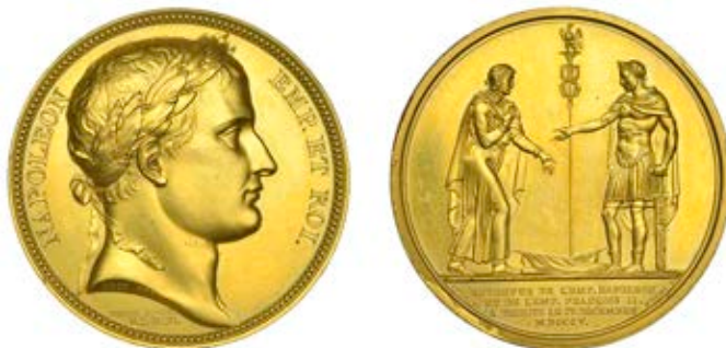
794 Meeting of Napoleon and Emperor Franz II , 1805, a copper-gilt medal by J-P. Droz and B. Andrieu, laureate head of Napoleon right, rev. two Emperors standing, standard over crossed flags in centre, 40mm (BDM I, 53). Lightly brushed, otherwise extremely fine £100-£120