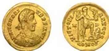
423 Honorius , Solidus, Mediolanum, c. 395-402, D N HONORIVS P F AVG, pearl-diademed, draped and cuirassed right, rev. VICTORIA AVGGG, Emperor standing right, holding standard in right hand and Victory on globe in left, treading on captive below, 4.42g (RIC X 1206). Scuffed on ear and with light surface marks, otherwise good very fine £200-£260