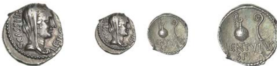
523 'LIBERATORS', Gaius Cassius Longus, Brutus and Cornelius Lentulus Spinther , Denarius, mobile military mint, c. 43-2, diademed and veiled bust of Libertas right, rev. jug and lituus, 3.71g (Craw. 500/5; BMCRR East 80; RSC 6). Very fine, old cabinet tone £300-£400 Provenance: Naville Auction 11 (Geneva), 30 November 2014, lot 173