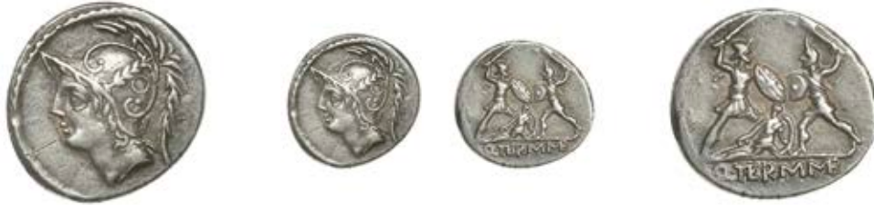
469 Q. Thermus M.f. , Denarius, Rome, c. 103, helmeted head of Mars left, rev. two warriors fighting, fallen soldier below, 3.98g (Craw. 319/1; BMCRR 653; RSC Minucia 19). Small scratch in obverse field, otherwise very fine, toned £100-£120