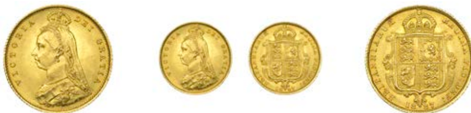
G 126 Half-Sovereign, 1887, Jubilee (M 478; S 3869). About as struck