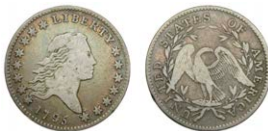
677 Half-Dollar, 1795, flowing hair, two leaves beneath each wing. Fine