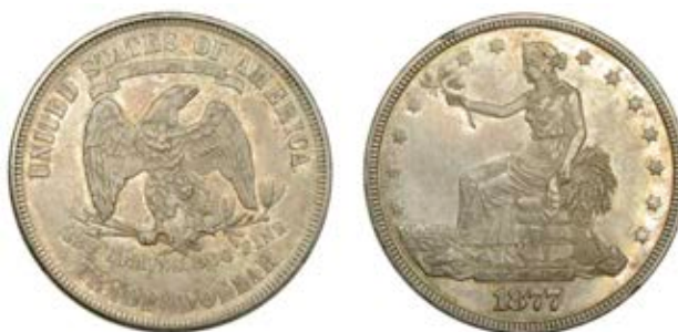
675 Trade Dollar, 1877. Extremely fine