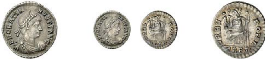
419 Gratian , Siliqua, Trier, 367-75, pearl-diademed and draped bust right, rev. Roma seated left, holding Victory on globe and spear, 2.50g (RIC 27F; RSC 86b). About extremely fine, toned £120-£150