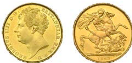
G 109 Two Pounds, 1823, edge iv (S 3798). Good extremely fine