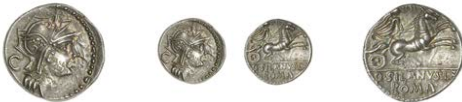
471 D. Silanus L.F. , Denarius, Rome, c. 91, helmeted head of Roma right, c behind, rev. Victory driving galloping biga right, 3.79g (Craw. 337/3; BMCRR 1772; RSC Junia 15). Metal flaw on cheek, otherwise about extremely fine, lightly toned £150-£180