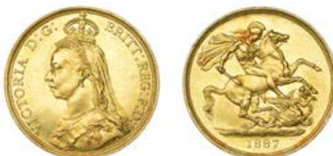
G 118 Two Pounds, 1887 (S 3865). About as struck £1,000-£1,200