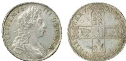
73 Halfcrown, 1698, edge DECIMO (ESC 1034 [554]; S 3494). Adjustment marks on obverse, otherwise about as struck, mint bloom £800-£1,000