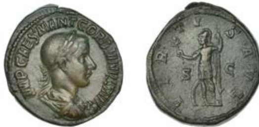
369 Gordian III , Sestertius, Rome, 240, laureate, draped and cuirassed bust right, rev. Virtus standing front in military attire, holding branch and spear, 20.45g (RIC 273). Very fine with an attractive portrait, reverse nearly so £80-£100