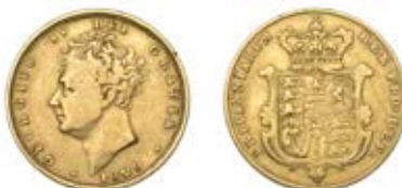
G 110 Sovereign, 1829 (M 14; S 3801). Fine