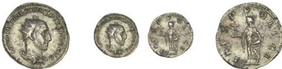
374 Æmilian , Antoninianus, Rome, 253, radiate and cuirassed bust right, rev. Spes advancing left, holding flower and raising skirt, 3.27g (RIC 10; RSC 47). Flan crack at 2 o'clock and some minor deposits, otherwise very fine, obverse better with a clear portrait £80-£100