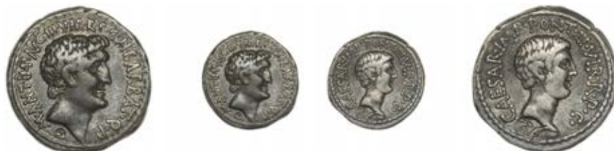
524 SECOND TRIUMVIRATE, Mark Antony and Octavian , Denarius, Ephesus, 41, bare head of Antony right, rev. bare head of Octavian right, 4.22g (Craw. 517/2; RSC 8). Banker's mark below bust on obverse, stamped '36' below bust on reverse, otherwise good very fine, toned £300-£400