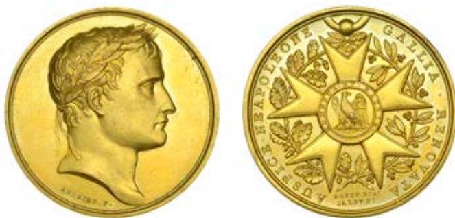
795 Creation of the Legion of Honour , a copper-gilt medal [c. 1806] by B. Andrieu and L. Jaley, laureate head of Napoleon right, rev. Legion of Honour, wreath behind, 40mm (BDM III, 54). Some marks on edge and slight wear to gilding on high points, otherwise extremely fine £100-£120