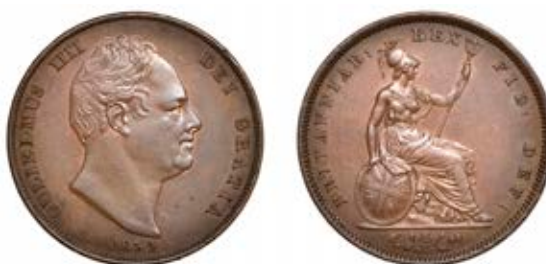
115 Penny, 1834 (BMC 1459; S 3845). Some contact marks, otherwise about extremely fine