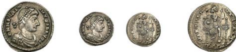
421 Magnus Maximus , Siliqua, Trier, 383-8, pearl-diademed and draped bust right, rev. Roma seated, holding spear and globe, 2.05g (RIC 84B; RSC 20a). Good very fine, lightly toned £100-£120