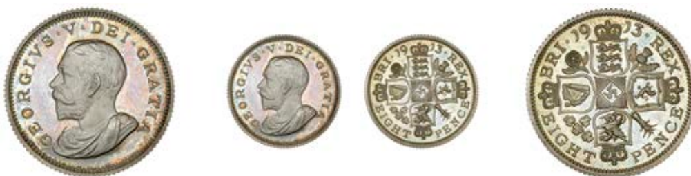
168 Pattern Octorino, 1913 by J. Pinches for R. Huth, in silver, bust left, rev. cruciform shields, edge grained, 3.78g (ESC 3859 [1481]). About as struck, toned £1,500-£1,800 Provenance: Bt Seaby 1969