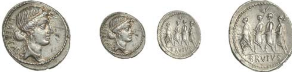
504 Q. Servilius Cæpio (M. Junius) Brutus , Denarius, c. 54, head of Libertas right, rev. consul walking left between two lictors, carrying axes over their shoulders and preceded by an accensus, 3.82g (Craw. 433/1; BMCRR 3861; RSC Junia 31). Two small scratches in obverse field, otherwise good very fine, lightly toned with underlying bloom £200-£260 Provenance: Naville Auction 9 (Geneva), 14 September 2014, lot 185