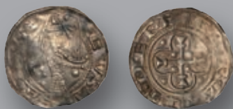
28 Eustace Fitzjohn , Penny, York, Phase 7, helmeted knight standing right, holding upright sword, · EVSTACIVS +, rev. cross within quatrefoil, EBOR · ACIT · DEFT, 1.25g/12h (Allen NC 2016, dies unlisted, cf. 119; cf. Mack 221-2; N 929a; S 1316). Good very fine, centrally struck with a detailed portrait and both legends fully legible, lightly toned, pleasing and extremely rare £10,000-£15,000

Provenance: Found at Thornton-le-Dale (N Yorkshire) (EMC 2020.0251)