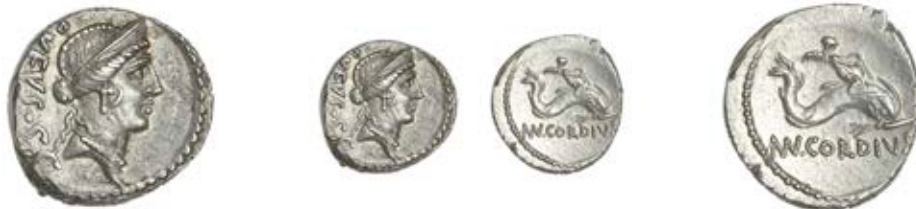
521 CÆSARIANS, Mn. Cordius Rufus , Denarius, 46, diademed head of Venus right, rev. Cupid on dolphin right, 3.88g (Craw. 463/3; BMCRRR 4040; RSC Cordia 3). A few scratches on reverse, otherwise extremely fine, toned £200-£260 Provenance: NAC Auction 52 (Zurich), 7 October 2009, lot 885