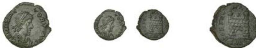
422 Flavius Victor , Half-Centenionalis, Aquileia, pearl-diademed and draped bust right, rev. camp-gate, star above, SMAQ in exergue, 1.47g (RIC 55b; Sear 20675). Smoothing in reverse fields, otherwise good very fine, portrait attractive and clear, very rare £100-£120