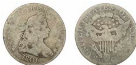
679 Quarter-Dollar, 1806, draped bust, heraldic eagle. Fair