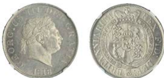
108 Halfcrown, 1818 (ESC 2099 [621]; S 3789). Virtually mint state [slabbed NGC MS 64] £900-£1,000