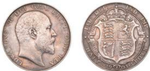
158 Halfcrown, 1903 (ESC 3569 [748]; S 3980). Lightly cleaned, some contact marks, otherwise about very fine, rare £200-£260 Provenance: Spink Auction 231, 22-3 September 2015, lot 925