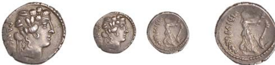
506 C. Vibius Pansa Cætronianus , Denarius, Rome, c. 48, head of Liber right wearing ivy-wreath, rev. Ceres walking right holding two torches, plough by feet, 3.74g (Craw. 449/2; BMCRR 3976; RSC Vibia 16). Good very fine, toned £100-£120