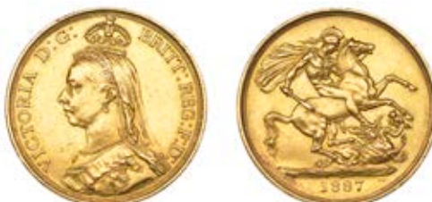
G 119 Two Pounds, 1887 (S 3865). About extremely fine £800-£1,000