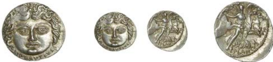
507 L. Plautius Plancus , Denarius, Rome, 47, head of Medusa facing, rev. Victory, half draped, flying right, leading four horses, 3.90g (Craw. 453/1c; BMCRR 4009; CRI 29A; RSC Plautia 14). A little weak at 11 o'clock (and corresponding on reverse), otherwise extremely fine, lightly toned and attractive £200-£300 Provenance: Artemide Auction 43 (San Marino), 6 June 2015, lot 188