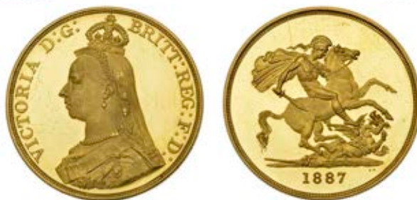
G 116 Proof Five Pounds, 1887 , with initials, edge grained, 39.90g/12h (WR 285; S 3864). Minor hairlines and surface marks, otherwise about as struck [slabbed NGC PF 61 Ultra Cameo] £12,000-£15,000