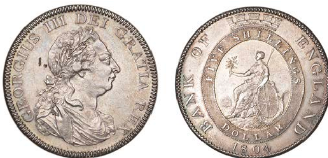
x 321 Dollar, 1804, types E/2, no stop after REX, leaf to centre of E in DEI, incuse κ on rev. (ESC 1951; S 3768). Two small digs behind head, otherwise nearly extremely fine, lightly toned £300-£360