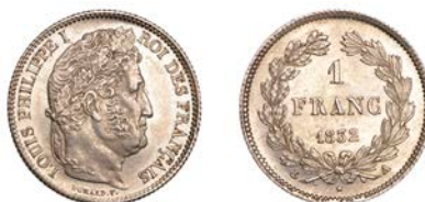
587 Louis Philippe , Franc, 1832 A , Paris (Gad. 453; KM. 748.1). Extremely fine £100-£120