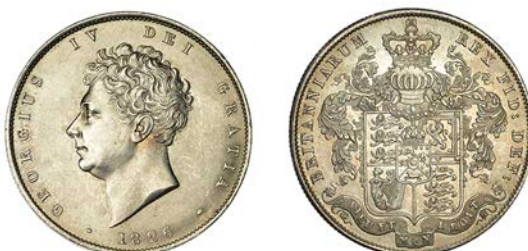
363 Halfcrown, 1826 (ESC 2375; S 3809). Good extremely fine £500-£600