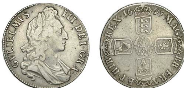
285 Crown, 1695, first bust, edge OCTAVO (ESC 991; S 3470). Sometime lightly cleaned, otherwise good fine £100-£150