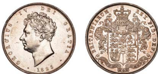
x 362 Halfcrown, 1825 (ESC 2371; S 3809). Sometime cleaned, otherwise nearly extremely fine, reverse better £200-£300