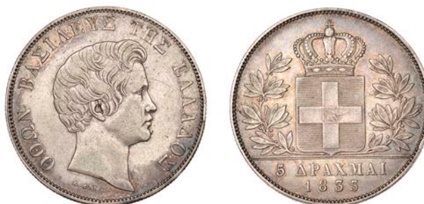
611 Otto , 5 Drachmai, 1833 (Dav. 115; KM. 20). Good very fine