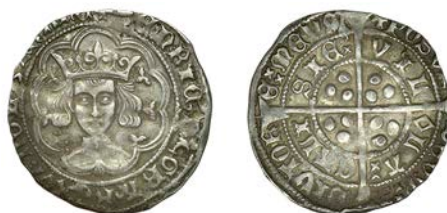
195 Leaf-Mascle issue, Groat, Calais, mm. cross V, leaf on breast, reads FRANC, leaf and saltire after SIE, mascle before and double saltire after LA, 3.72g/12h (Whitton 33; N 1475; S 1890). Slightly off-centre, otherwise nearly very fine, scarce £100-£120

Provenance: From the Reigate Brokes Road (Surrey) Hoard, 1990; Glendining Auction, 8 December 1992, lot 319 (part); J.R. Hulett Collection, Part XV, DNW Auction 169, 12-13 February 2020, lot 38 [from P. Wallwork December 1992]