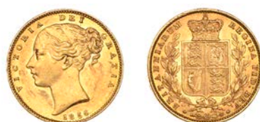
G 379 Sovereign, 1856 (M 39; S 3852D). Good extremely fine