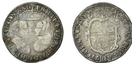
69 Shilling, 1555, English titles and mark of value, 5.62g/6h (N 1968; S 2501). Fine, but obverse very scratched £150-£180