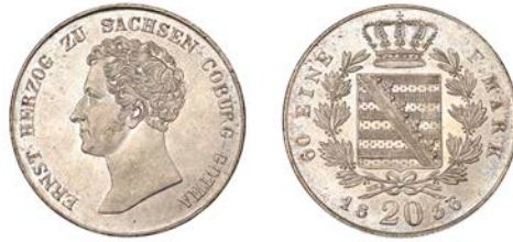
607 Saxe-Coburg-Gotha, Ernst I , 20 Kreuzer, 1836 (KM. C96a). Good extremely fine