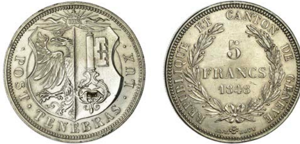
691 GENEVA , 5 Francs, 1848 (HMZ 364; Dav. 375; KM. 137). Flan flaw on obverse and has been cleaned, otherwise about extremely fine, scarce