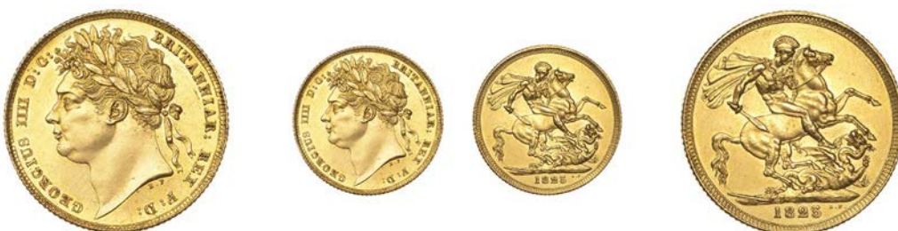
G 350 Sovereign, 1825, type 1 (M 9; S 3800). Good very fine, but sometime wiped and with resultant hairlines £1,500-£2,000