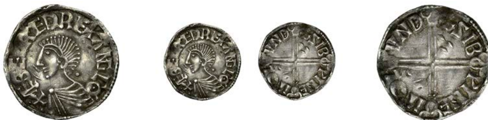
167 Penny, Long Cross type, London, Sibwine, SIBPINE M'O LVND, 1.69g/6h (SCBI Copenhagen 930, same dies; BEH 2901; N 774; S 1151). Peckmarked and flan lightly crimped, otherwise very fine, toned £200-£260