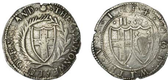
258 Halfcrown, 1654, mm. sun on obv. only, 14.50g/3h (ESC 40; N 2722; S 3215). Minor double-striking, otherwise about very fine £300-£400