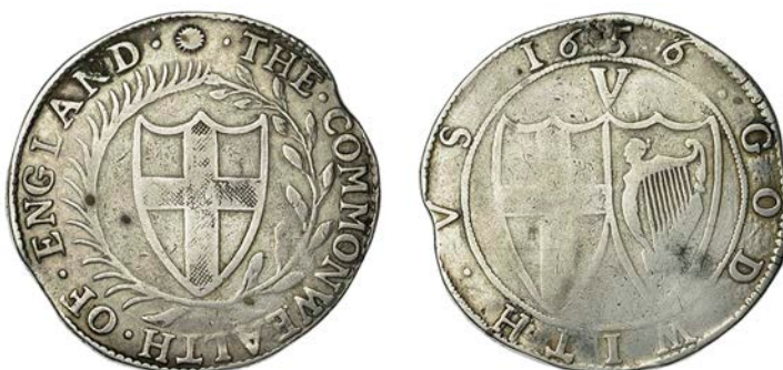
252 Crown, 1656/4, mm. sun on obv. only, 29.28g/2h (ESC 11; N 2721; S 3214). Plugged, otherwise good fine £400-£500