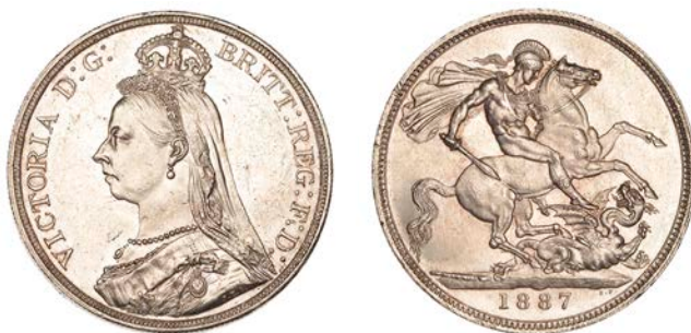
388 Crown, 1887 (ESC 2585; S 3921). A few minor marks, otherwise about as struck