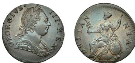
317 Halfpenny, 1775 (BMC 908; S 3774). Both sides struck slightly off-centre, otherwise good very fine £100-£120