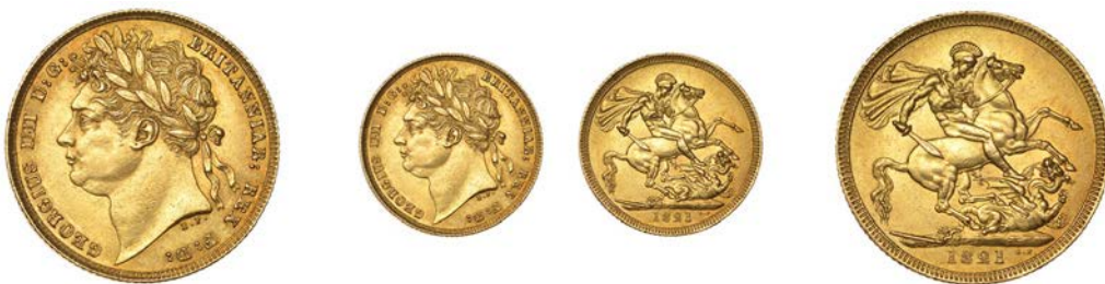
G 347 Sovereign, 1821 (M 5; S 3800). About extremely fine