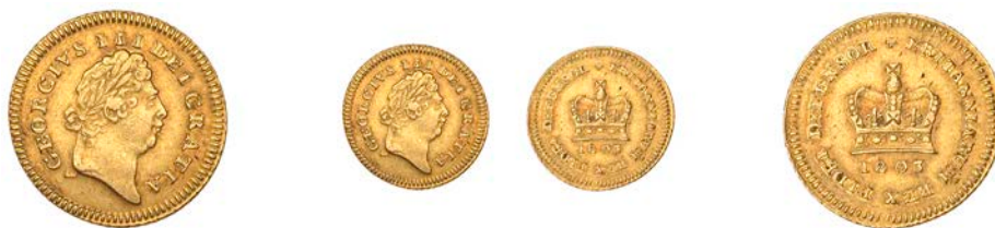
G 314 Third-Guinea, 1803, first bust (EGC 873; S 3739). About very fine £150-£180