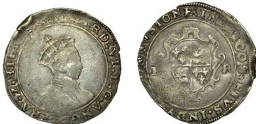
213 Second period, 6 oz. issue, Shilling, undated, Durham House, mm. bow, Durham House bust 2, normal legends, wire-line inner circles, 4.36g/9h (Bispham 5F; N 1924; S 2472). Good fine for issue £100-£150