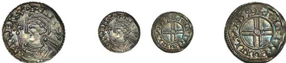
8 Penny, Short Cross type, London, Ælfwine, ÆLPINE ON LVND, 1.04g/6h (BEH 1976; N 790; S 1159). Nearly extremely fine, attractively toned £240-£300