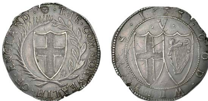
251 Crown, 1653, mm. sun on obv. only, 29.56g/11h (ESC 6; N 2721; S 3214). Minor edge flaws and some double-striking in legends, otherwise good very fine and toned £2,000-£2,600