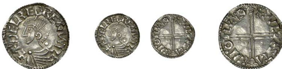
168 Penny, Long Cross type, London, Wulfstan, PVLFSTAN M'O LVND, 1.37g/12h (SCBI Copenhagen 964; BEH 2990-1; N 774; S 1151). A few peckmarks on reverse and flan slightly crimped, otherwise about extremely fine £300-£400