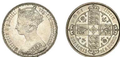
401 Florin, 1886 (ESC 2911; S 3900). Lightly brushed on obverse, otherwise extremely fine