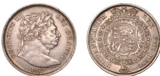
338 Halfcrown, 1817, large head (ESC 2090; S 3788). Nearly extremely fine