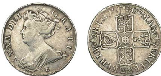
294 Halfcrown, 1707E, edge SEXTO (ESC 1379; S 3605). Some adjustment marks, otherwise about very fine £150-£180