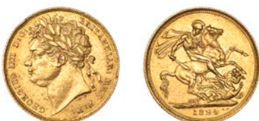
G 349 Sovereign, 1824 (M 8; S 3800). Some surface and rim marks, otherwise better than very fine