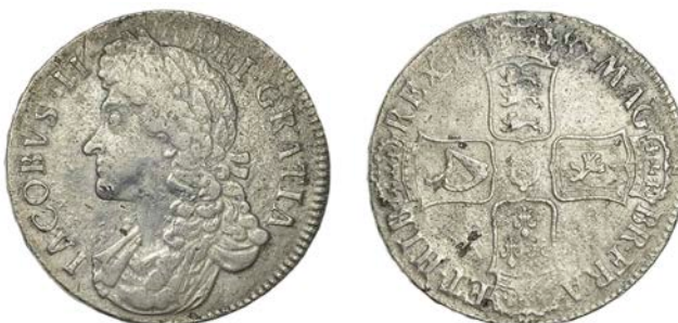
279 Crown, 1687, second bust, edge TERTIO (ESC 743; S 3407). Waterworn, fine