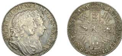
281 Shilling, 1693, 9 over 0 (ESC 867a; S 3437). Some flecking, otherwise very fine, the overdate scarce £300-£400