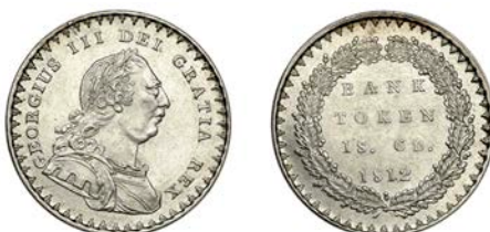
324 Eighteen Pence, 1812, type 1 (ESC 2114; S 3771). Extremely fine £150-£180