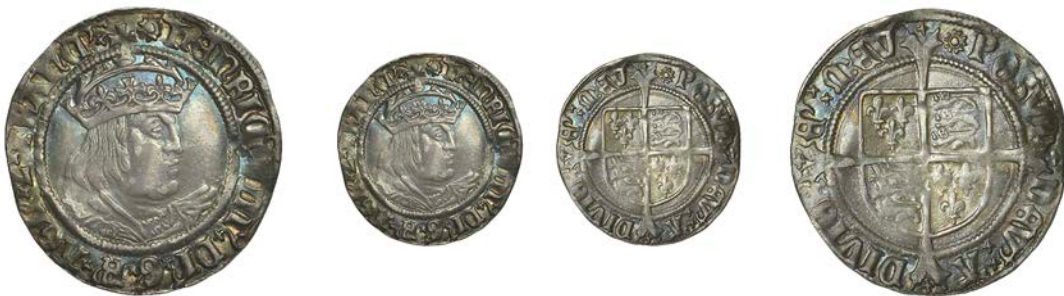
52 Second coinage, Groat, Tower, mm. rose, bust D, saltires in forks, 2.71g/12h (Whitton i; N 1797; S 2337E). A little creased, otherwise about very fine with pleasant toning £100-£150