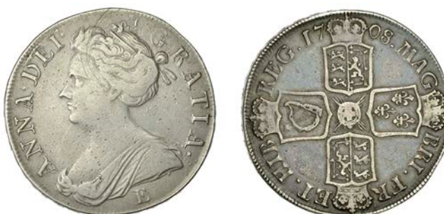
293 Crown, 1708E, edge SEPTIMO (ESC 1356; S 3600). Scratch on forehead and obverse sometime lightly cleaned, otherwise good fine £100-£120