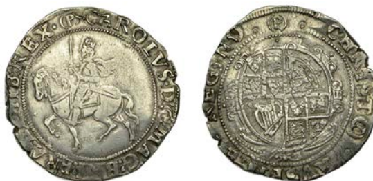
239 Tower mint (under Parliament), Halfcrown, Gp III, type 3a3, mm. (P), later horseman, 14.41g/1h (Bull 488ff; SCBI Brooker 354ff; N 2213; S 2778). Double-struck, otherwise fine £150-£180