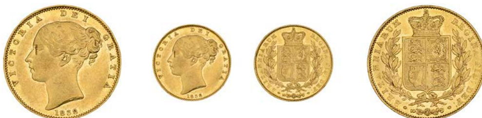
G 375 Sovereign, 1838 (M 22; S 3852). Surfaces bagmarked, otherwise good very fine, reverse better, rare Provenance: Bt R. Lobel