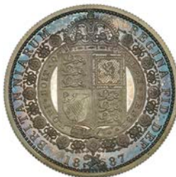
394 Proof Halfcrown, 1887 (ESC 2772; S 3924). Minor surface mark in obverse field and lightly hairlined, otherwise about as struck, attractively toned