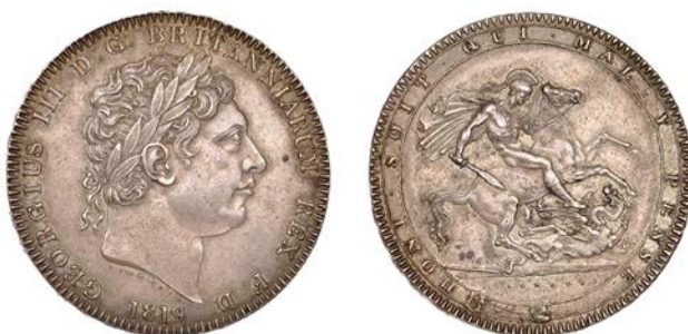
333 Crown, 1819, edge LIX (ESC 2010; S 3787). Some contact marks, otherwise about extremely fine