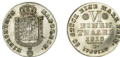
610 Westphalia, Hieronymus Napoleon , Sixth-Thaler, 1813 B (KM. C11). Lightly cleaned, otherwise good extremely fine