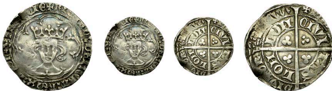
190 Second period, Groat, type III, London, mm. cross pattée, 4.38g/6h (Potter IIIc/IIIb; Stewartby p.261, pl. 13, 272; N 1321a; S 1680). Reverse struck slightly off-centre, otherwise about very fine, very rare £500-£700