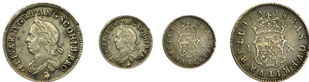
262 Sixpence (or Ninepence), 1658, laureate bust left, liberty cap below, rev. crowned shield, i-x at sides, edge plain, 5.36g/6h (cf. ESC 260ff; cf. S 3229; cf. Lessen IV, 1286). An 18th century cast after the Dutch copy; W stamped in obverse field, very fine and very rare