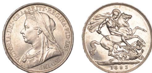
391 Crown, 1893, edge LVI (ESC 2593; S 3937). Extremely fine, reverse proof-like