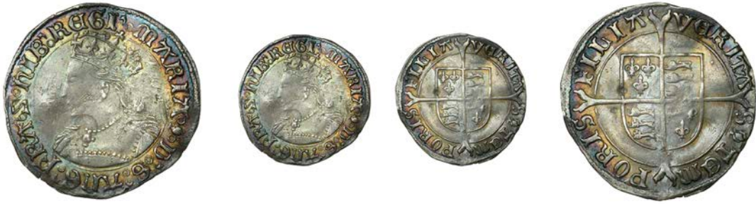
67 Groat, mm. pomegranate, 1.82g/12h (N 1960; S 2492). A little scored on obverse, otherwise about very fine, toned £150-£200