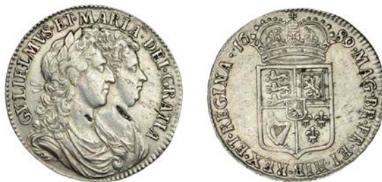
280 Halfcrown, 1689, first shield, caul only frosted, pearls, edge PRIMO (ESC 831; S 3434). Cleaned and with two flan flaws on obverse, otherwise very fine £150-£180