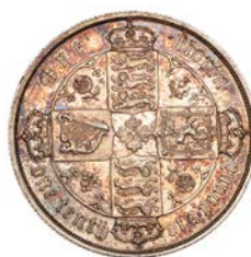
x 399 Florin, 1878, die 51 (ESC 2889; S 3895). Some surface marks, otherwise about extremely fine, toned