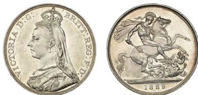
389 Crown, 1889 (ESC 2589; S 3921). Lightly hairlined and minor marks in fields, otherwise extremely fine