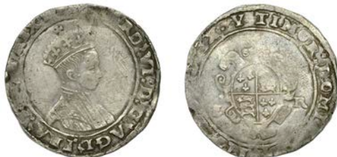
211 Second period, 6 oz. issue, Shilling, MDXLIX, Southwark, mm. y, bust 3, 4.58g/12h (N 1918; S 2466B). Scuffed on obverse, otherwise about very fine, toned £150-£200