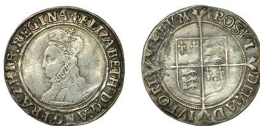
72 First issue, Shilling, mm. lis, bust 1D, beaded and wire-line inner circles, 5.44g/6h (N 1985; S 2549). Some corrosion in reverse legend and lightly scratched on obverse, otherwise fine or better, scarce