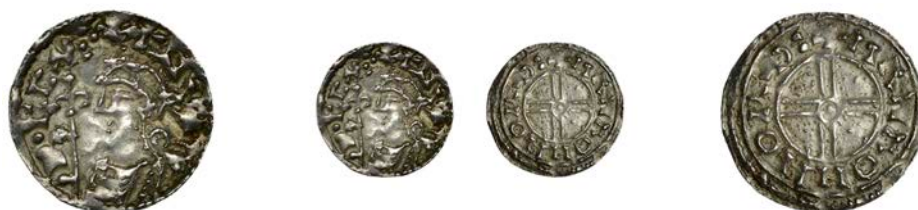
171 Penny, Short Cross type, Norwich, Manna, MANA ON NORD, 1.15g/6h (SCBI East Anglia 1244; BEH 2959-60; N 790; S 1159). Struck from worn dies, otherwise very fine £240-£300