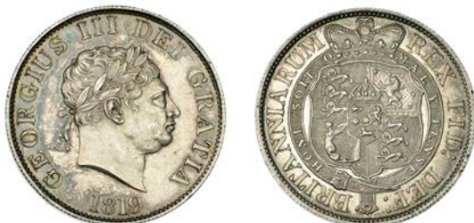
341 Halfcrown, 1819 (ESC 2102; S 3789). Lightly hairlined and some minor marks, otherwise about as struck