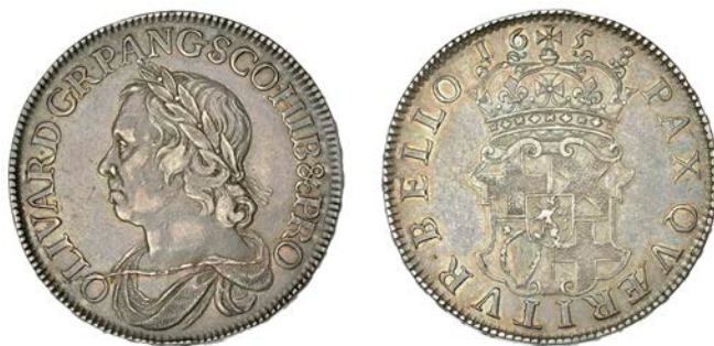
260 Crown, 1658/7 (Lessen E12; ESC 240; S 3226). Good very fine, toned