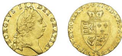
x 309 Guinea, 1792, fifth bust (EGC 720; S 3729). Good very fine, but a few light scratches