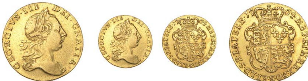
x 305 Guinea, 1764, second bust, no stop over head (EGC 674; S 3726). About very fine, very rare