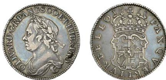
261 Halfcrown, 1658 (Lessen I26; ESC 252; S 3227A). Flan flaw in obverse legend, otherwise very fine, reverse better