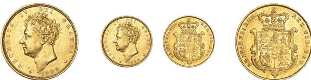
G 351 Sovereign, 1825, type 2 (M 10; S 3801). Some light bagmarking, otherwise nearly extremely fine