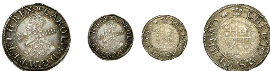
242 Aberystwyth mint, Groat, mm. book, large bust, 1.97g/7h (Morr. A-1; SCBI Brooker 761; N 2337; S 2891). About extremely fine, toned £150-£180