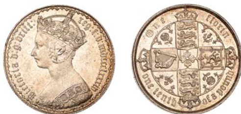
x 400 Florin, 1884 (ESC 2907; S 3900). Light surface marks, otherwise good extremely fine