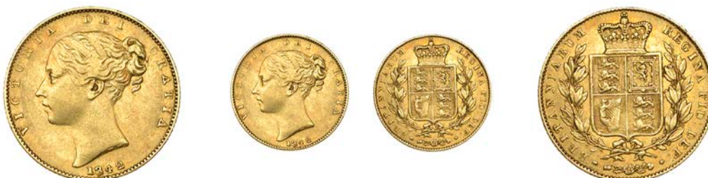
G 376 Sovereign, 1842, inverted vs for AS in GRATIA, closed 2 (M 25; S 3852). Good fine, very rare