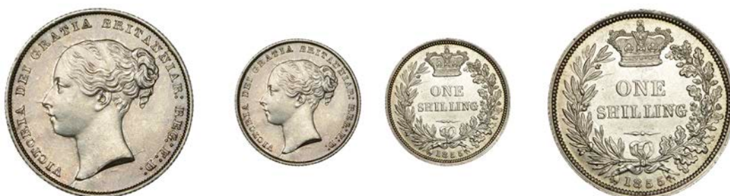
402 Shilling, 1855 (ESC 3006; S 3904). Obverse sometime cleaned and now re-toned, otherwise extremely fine