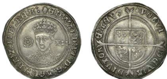
215 Third period, Fine issue, Shilling, mm. tun, 5.98g/1h (N 1937; S 2483). Minor scuff on obverse, otherwise very fine, lightly toned £200-£260