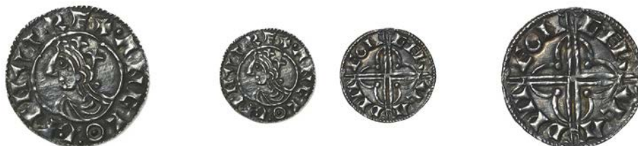
170 Penny, Quatrefoil type, Cambridge, Eadwine, EADPINE ON GÆR, London style, 0.75g/3h (BEH –; N 781; S 1157). Good very fine, dark tone, extremely rare of this moneyer for the type Jacob (SCMB 1984, p.75), refers to misplaced letters and abnormal spellings in the mint-signature on some Cambridge coins £300-£400