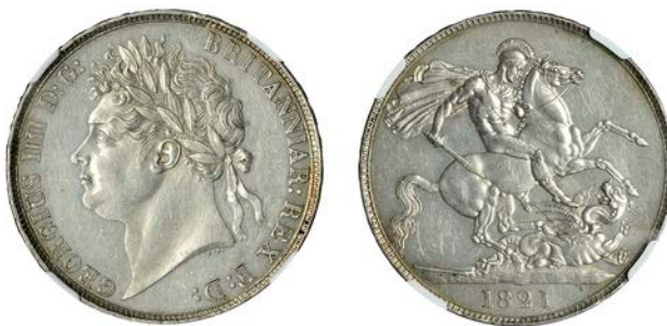
359 Crown, 1821, edge SECUNDO (ESC 2310; S 3805). Cleaned, otherwise extremely fine [slabbed NGC AU Details, Surface Hairlines] £300-£400