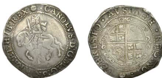
241 Tower mint (under Parliament), Halfcrown, Gp III, type 3a3, mm. sun, 14.07g/10h (Bull 526ff; SCBI Brooker 363; N 2213; S 2778). Good fine, toned £150-£180