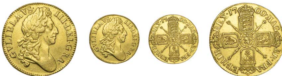
284 Guinea, 1700, second bust (EGC 423; S 3461). Possibly removed from a mount, otherwise about very fine £800-£1,000