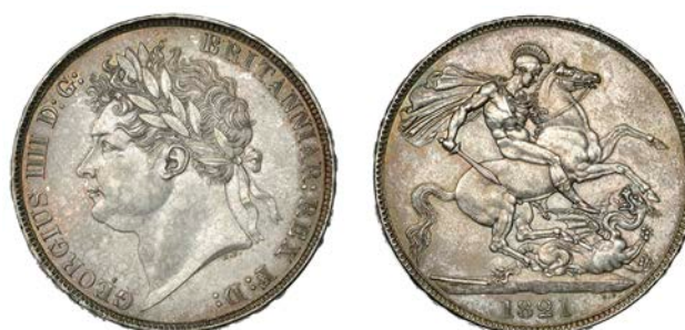
358 Crown, 1821, edge SECUNDO (ESC 2310; S 3805). Obverse sometime lightly brushed and now re-toned, otherwise better than extremely fine