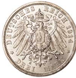
591 ANHALT-DESSAU, Friedrich II , 3 Marks, 1914 A (KM. 30). About as struck