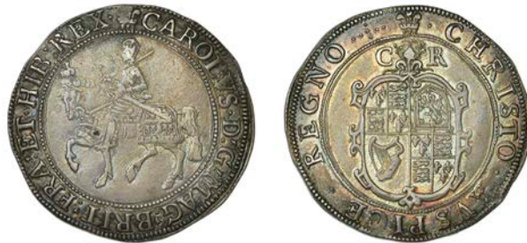
97 Tower mint, Halfcrown, Gp II, type 2a, mm. plume, rev. lis over rose between c r, 14.96g/6h (Bull 101/9; SCBI Brooker 298; N 2205; S 2769). Nearly very fine, trace of cabinet wear, scarce £200-£300