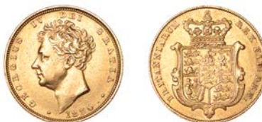
G 356 Sovereign, 1830 (M 15; S 3801). Better than very fine, but surfaces wiped