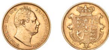
G 364 Sovereign, 1831, first bust, w w incuse without stops (M 16A; S 3829A). Good fine, reverse a little better, rare £800-£1,000