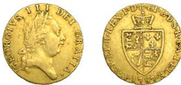
312 Half-Guinea, 1787 (EGC 829; S 3735). Light surface marks consistent with having been excavated, otherwise good fine £150-£200