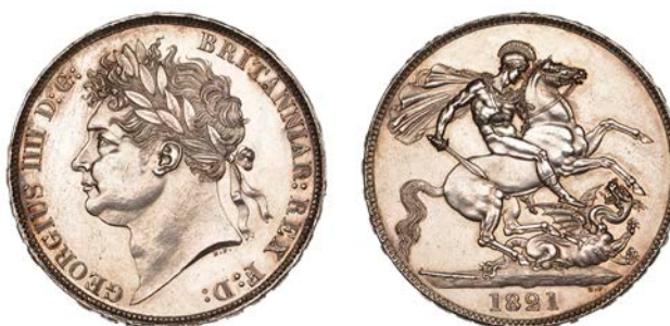
x 357 Crown, 1821, edge SECUNDO (ESC 2310; S 3805). A few light surface marks, otherwise better than extremely fine