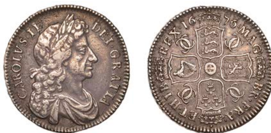
275 Halfcrown, 1676, fourth bust, edge VICESIMO OCTAVO, retrograde 1 in date (ESC 472; S 3367). Very fine, reverse better