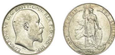
407 Florin, 1906 (ESC 3582; S 3981). About extremely fine