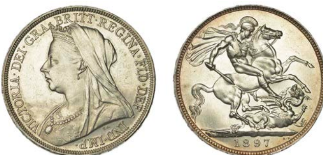
392 Crown, 1897, edge LX (ESC 2602; S 3937). Of bright appearance, minor surface marks, otherwise virtually as struck, reflective fields