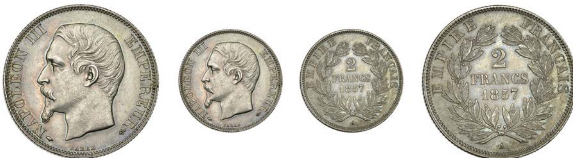
588 Napoleon III , 2 Francs, 1857 A , Paris (Gad. 523; KM. 780.1). Extremely fine and toned, rare £600-£800