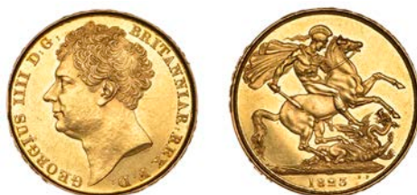
G 345 Two Pounds, 1823, edge iv (S 3798). A few light surface marks and hairlines, a rim bruise at 9 o'clock, otherwise better than extremely fine