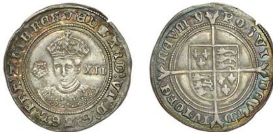
64 Third period, Fine issue, Shilling, mm. y, crown with frosted caul, 6.04g/9h (N 1937; S 2482). Tiny edge split, otherwise good very fine, toned £300-£400