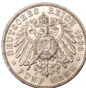
596 BREMEN, Free City , 5 Marks, 1906 i (Dav. 630; KM. 251). Extremely fine