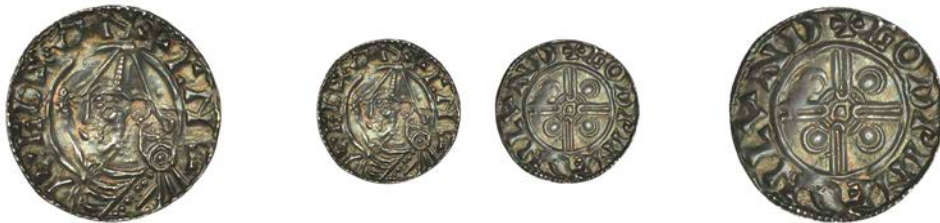
7 Penny, Pointed Helmet type, London, Godwine, GODPINE ON LVND, obv. , reads CNV RECX AN, 1.06g/6h (SCBI Copenhagen 2652; BEH 2485; N 787; S 1158). A little double-struck on face, otherwise very fine, toned £200-£240