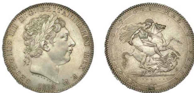
332 Crown, 1818, edge LIX (ESC 2009; S 3787). Good extremely fine