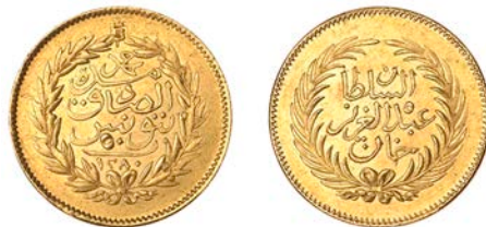
G 694 Abdul Aziz and Muhammad al-Sadiq Bey , 50 Piastres, 1280h, 9.78g/12h (OC 32-011-01; KM. 152; F 3). Extremely fine, very rare