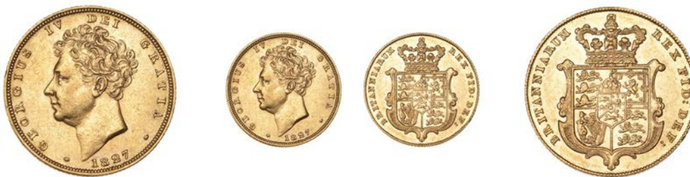
G 353 Sovereign, 1827 (M 12; S 3801). Some light surface marks, otherwise extremely fine