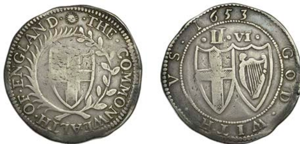
256 Halfcrown, 1653, mm. sun on obv. only, 14.82g/2h (ESC 30; N 2722; S 3215). Full round flan, about very fine £300-£400