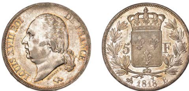
584 Louis XVIII (Second reign), 5 Francs, 1818 B , Rouen (Gad. 614; KM. 711.2). Extremely fine with some toning £150-£180