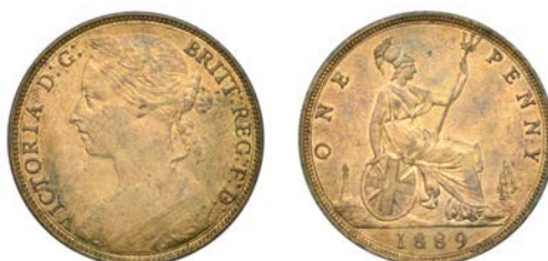
404 Penny, 1889, 14 leaves (F 128; BMC 1741A; S 3954). Better than extremely fine, some original colour Provenance: D.L.F. Sealy Collection