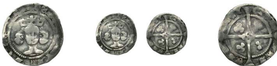
191 Heavy coinage, Penny, York, Abp Scrope, early bust, quatrefoil in centre of rev., 1.05g/11h (Archibald, BNJ 1969, p.76, no. 995, perhaps this coin ; Stewartby p.267; N 1350; S 1722). Fine, rare £200-£260