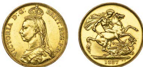
G 373 Two Pounds, 1887 (S 3865). Good very fine