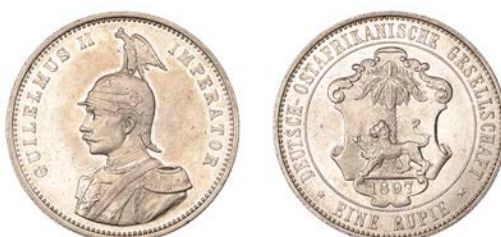
590 Wilhelm II , Rupie, 1897 (KM. 2). Extremely fine £100-£120