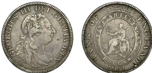
322 Dollar, 1804, types E/2, similar (ESC 1951; S 3768). Surface marks, otherwise good fine £100-£120