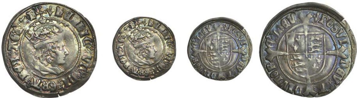
51 Profile issue, Groat, mm. pheon, 3.06g/4h (N 1747; S 2258). A little creased, otherwise nearly very fine, toned £150-£180