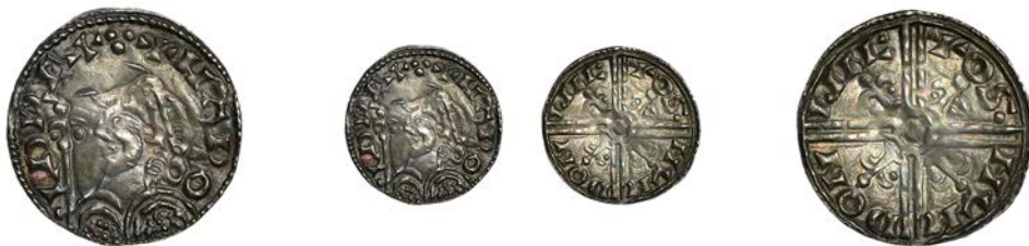
9 Penny, Long Cross and Fleur-de-lis type, Lincoln, Osmund, OS · MVND ON LINC, 1.10g/9h (Mossop dies Aa, and pl. lxi; SCBI Lincolnshire 560; BEH 430; N 803; S 1165). A few peckmarks, otherwise nearly extremely fine, toned £1,000-£1,200