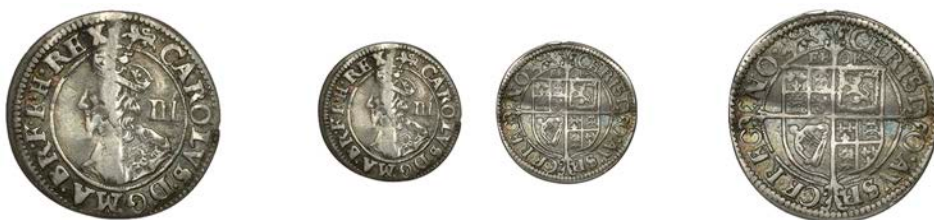
131 York mint, Threepence, Gp 1 [type 1], mm. lion, rev. reads AVSPCE, 1.36g/9h (DIG 2H; Besly 1H; SCBI Brooker 1109, same dies; N 2323; S 2877). Heavily creased on bust, otherwise nearly very fine £100-£120