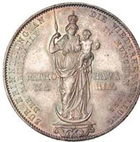
594 BAVARIA, Maximilian II , 2 Gulden, 1855 (Dav. 604; KM. 848). Extremely fine, toned