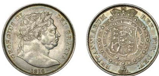
336 Halfcrown, 1816 (ESC 2086; S 3788). About extremely fine