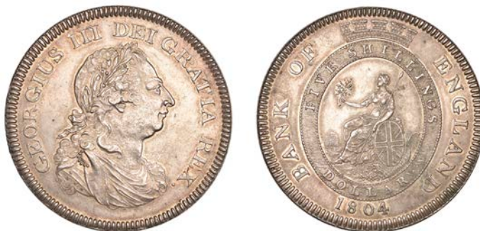
320 Dollar, 1804, types C/2b, stop after REX, leaf to centre of E in DEI, inverted incuse κ by shield (ESC 1941; S 3768). About extremely fine, faint traces of undertype visible on both sides £300-£400