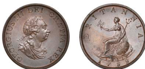
318 Halfpenny, 1799, six gunports (BMC 1249; S 3778). Good extremely fine £100-£120