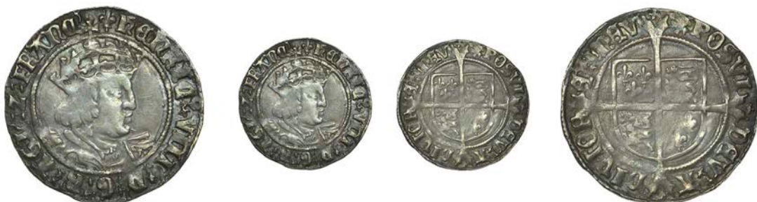
53 Second coinage, Groat, Tower, mm. lis on obv. , rose on rev. , bust D, saltires in forks, 2.86g/9h (Whitton iii; N 1797; S 2337E). Light surface scrape in front of face, otherwise nearly very fine, dark tone £100-£150