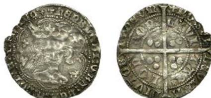
193 Light coinage, Secondary series, Groat, class III/ Henry V class A mule, mm. cross pattée, annulet to left of crown, pellet to right, 9 arcs to tressure, quatrefoil after POSVI, double saltire stops after TAS and DON, 3.27g/12h (N 1359b/1385; S 1760). Obverse about fine but corroded, reverse better, edge ragged £200-£260