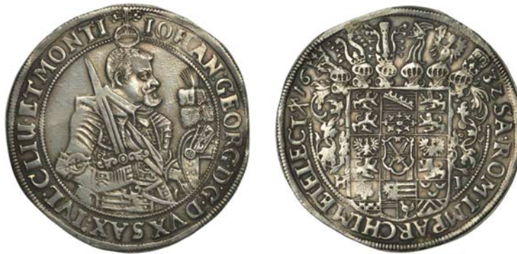
609 Saxony, Johann Georg I , Thaler, 1632, Dresden, 28.91g/10h (Schnee 845; Dav. 7601). Traces of mounting, otherwise good very fine