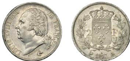
585 Louis XVIII (Second reign), 2 Francs, 1817 A , Paris (Gad. 513; KM. 710.1). Extremely fine £200-£260