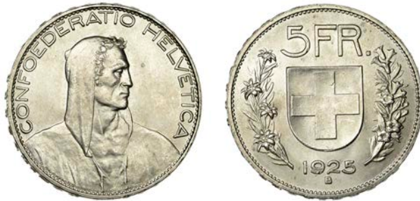
693 Confederation , 5 Francs, 1925b (HMZ 1199e; Dav. 394; KM. 38). About as struck