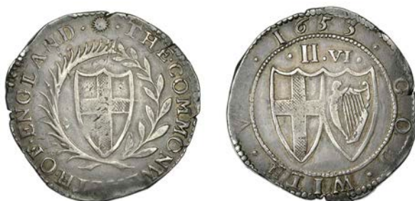
254 Halfcrown, 1653, mm. sun on obv. only, 14.81g/9h (ESC 28; N 2722; S 3215). Minor weakness in margins, otherwise good very fine with some toning £600-£800