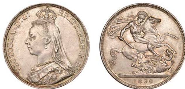
390 Crown, 1890 (ESC 2590; S 3921). Extremely fine