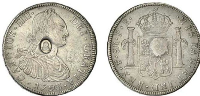
319 BOLIVIA, Charles III, 8 Réales, 1793 PR , Potosí, obv. countermarked with head of George III in oval, 26.74g (ESC 1855; S 3765A). Coin very fine with graffiti in obverse field, countermark better £400-£500