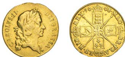
265 Guinea, 1668, third bust (EGC 238; S 3342). Mounted and gilt