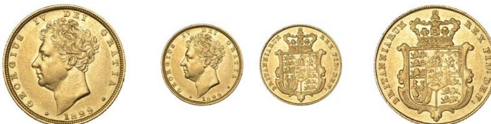
G 354 Sovereign, 1829 (M 14; S 3801). Some light bagmarking, otherwise about extremely fine