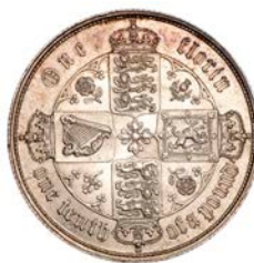
x 396 Florin, 1857 (ESC 2835; S 3891). Surface mark above crown, otherwise good extremely fine