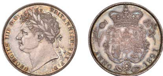
361 Halfcrown, 1821 (ESC 2360; S 3807). Light scratches at bottom of shield, otherwise about as struck, attractively toned £200-£260