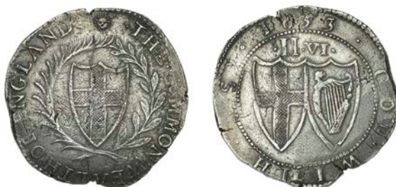
255 Halfcrown, 1653, mm. sun on obv. only, 14.99g/1h (ESC 28; N 2722; S 3215). Minor edge flaw and slightly double-struck, otherwise very fine £500-£700