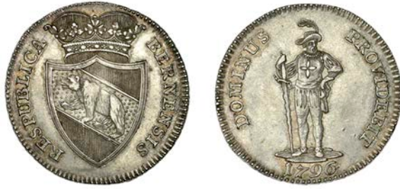
690 BERN , Half-Thaler, 1796 (HMZ 219a; KM. 151). Extremely fine