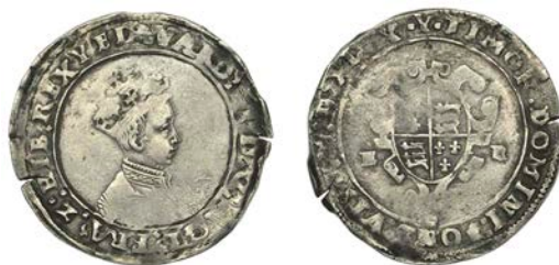
212 Second period, 6 oz. issue, Shilling, MDXLIX, Southwark, mm. y, bust 4, 5.03g/12h (N 1918; S 2466B). Several small striking splits, otherwise good fine, portrait better £150-£200