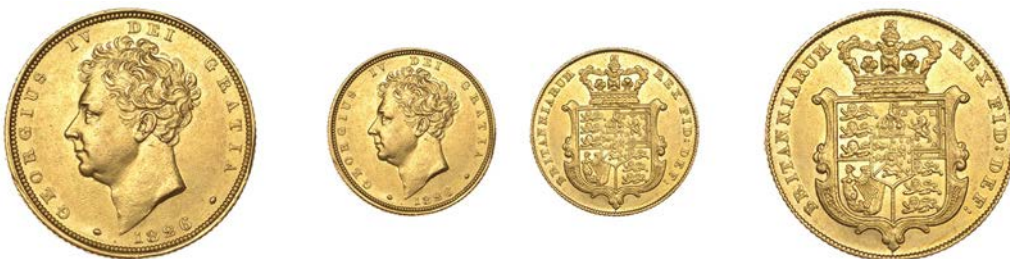
G 352 Sovereign, 1826 (M 11; S 3801). About extremely fine