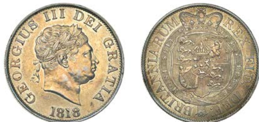
340 Halfcrown, 1818 (ESC 2099; S 3789). About extremely fine