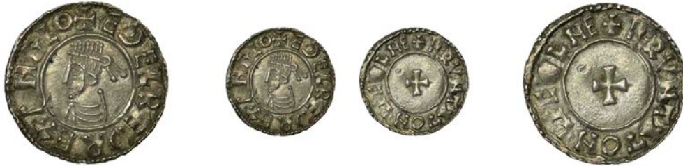
6 Penny, Last Small Cross type, Lincoln, Bruntat, BRVNTAT ON LICOLNE, 1.62g/7h (Mossop dies Fe, and pl. xxii, 2 rev. and 7-8 obv., same dies; SCBI Lincolnshire 240-2, same obv. die; BEH 1685; N 777; S 1154). Good very fine £240-£300