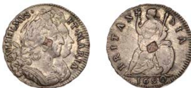
283 Farthing, 1690 (Cooke 655; BMC 580; S 3451). Copper plug; free of tin pest, attractive smooth surfaces, good very fine £700-£900