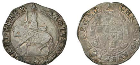
99 Tower mint, Halfcrown, Gp III, type 3a1, mm. bell, reads CAROLV · S, 14.89g/3h (Bull 226b/26; SCBI Brooker 322, same obv. die; N 2209; S 2773). Die flaw along horse's foreleg [not evident on Brooker specimen], good fine, toned £80-£100