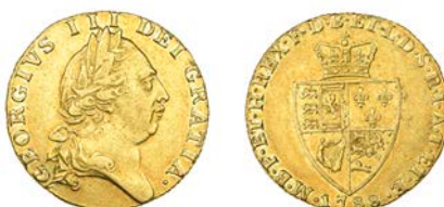
306 Guinea, 1788, fifth bust (EGC 713; S 3729). Very fine