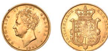
G 355 Sovereign, 1829 (M 14; S 3801). A few edge nicks and surface marks, otherwise better than very fine