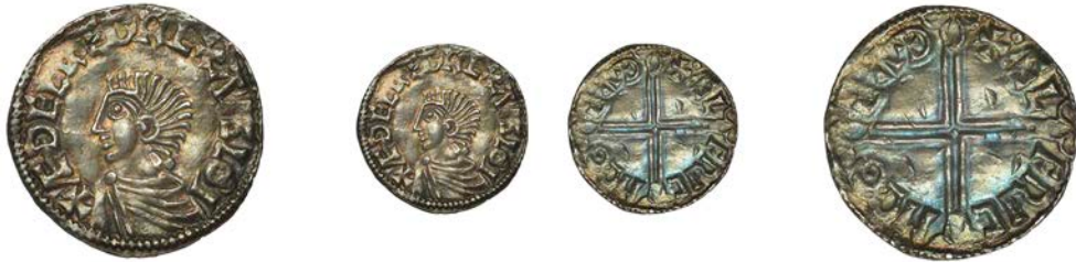
5 Penny, Long Cross type, Bath, Ælfric, ÆLFRIC MDO BAD, 1.76g/4h (SCBI Copenhagen 14; BEH 39; N 774; S 1151). A little crimped, otherwise good very fine, toned £300-£400