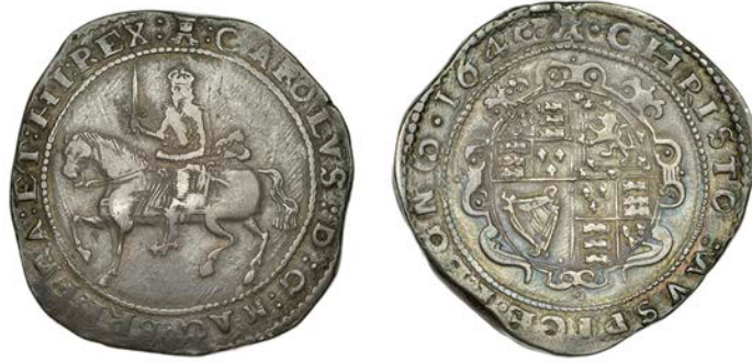
128 Exeter mint, Crown, 1645, mm. castle, date to left of mm., 28.55g/10h (Besly D26; SCBI Brooker 1044, same obv. die; N 2561; S 3062). Nearly very fine, toned £600-£800