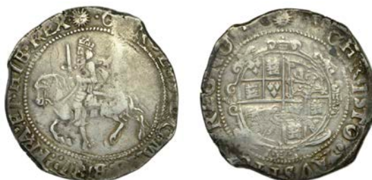
240 Tower mint (under Parliament), Halfcrown, Gp III, type 3a3, mm. sun, 14.63g/3h (Bull 524ff; SCBI Brooker 363; N 2213; S 2778). Double-struck, otherwise about very fine £150-£180