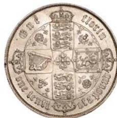
x 397 Florin, 1862 (ESC 2847; S 3891). Better than extremely fine, rare