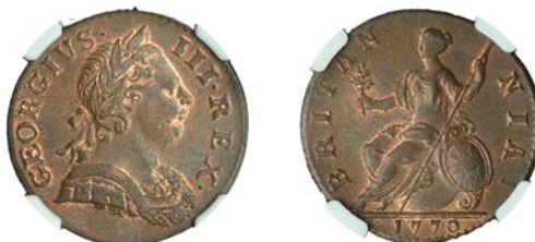
316 Halfpenny, 1770 (BMC 893; S 3774). Better than extremely fine, some original colour [slabbed NGC MS 63 BN] £200-£260