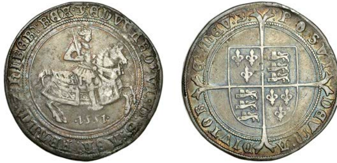
63 Third period, Fine issue, Crown, 1551, mm. y, 30.26g/6h (Lingford dies A-7; N 1933; S 2478). Nearly very fine £1,500-£1,800