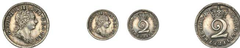
315 Proof Maundy Twopence, 1763, 1.17g/12h (ESC 2271; S 3756). Lightly hairlined, otherwise good extremely fine, extremely rare £1,200-£1,500