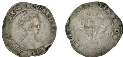
214 Third period, 3 oz issue, Shilling, MDLI, mm. lion, 4.70g/10h (N 1944/1; S 2473). Good fine for issue £100-£120