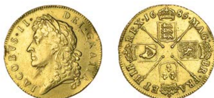
278 Guinea, 1685, first bust (EGC 320; S 3400). Mount marks at 2 and 10 o'clock and obverse with a small scuff under chin, otherwise about very fine, reverse fine and of bright appearance