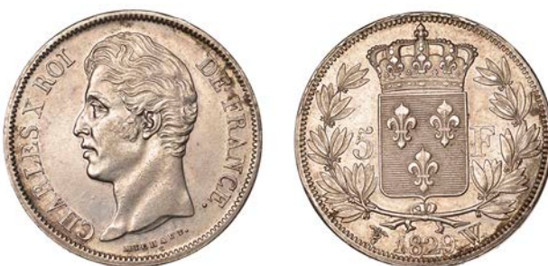
586 Charles X , 5 Francs, 1829 w , Lille (Gad. 644; KM. 728.13). About extremely fine £100-£120