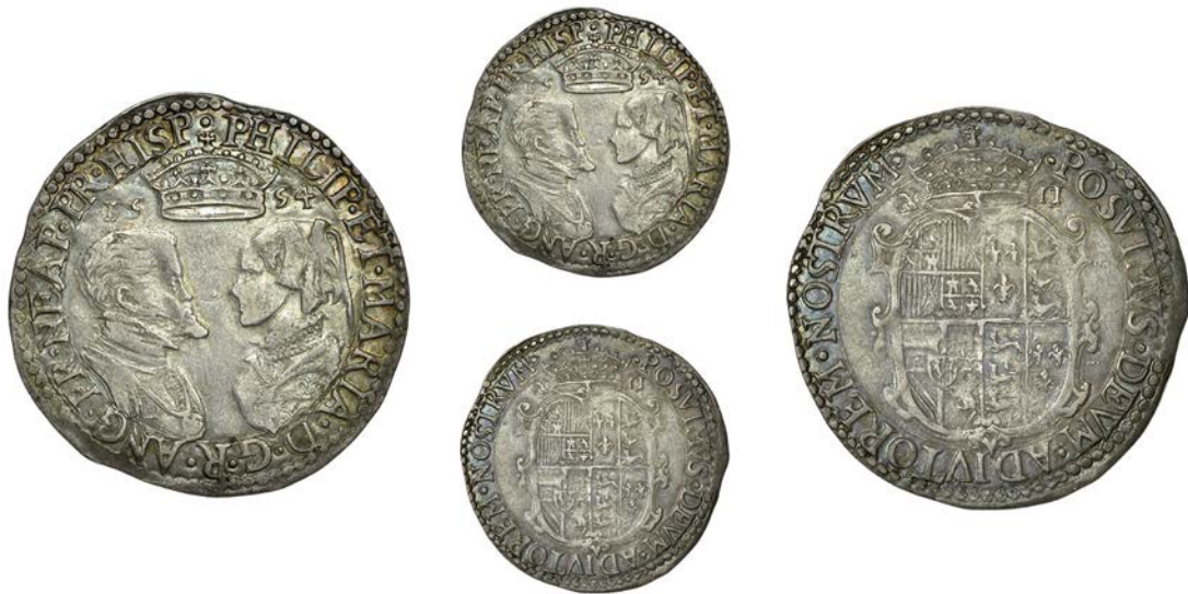
68 Shilling, 1554, full titles and mark of value, 6.32g/1h (N 1967; S 2500). A full round coin, good very fine with clear portraits and attractive toning, rare £1,200-£1,500