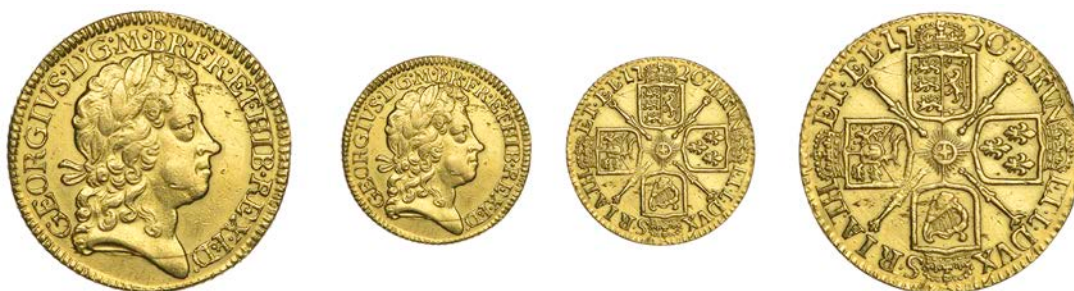
296 Guinea, 1720 (EGC 512; S 3631). Removed from a ring mount and of bright appearance, otherwise better than very fine £1,000-£1,200