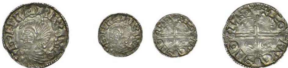
166 Penny, Long Cross type, London, Leofnoth, LEOFNOD M'O LVND, 1.62g/6h (SCBI Copenhagen 867, same dies; SCBI Mack 943, same obv. die; BEH 2671; N 774; S 1151). Peckmarked, otherwise very fine, dark-toned £200-£260