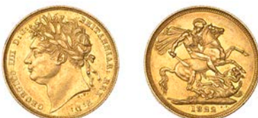
G 348 Sovereign, 1822 (M 6; S 3800). Good very fine