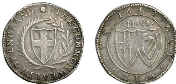
253 Halfcrown, 1652, mm. sun on obv. only, 14.39g/5h (ESC 24; N 2722; S 3215). Very fine £400-£500