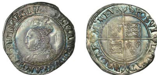
73 Second issue, Shilling, mm. martlet, bust 3C, beaded inner circles, 6.08g/7h (N 1985; S 2555). Scratched in obverse legend and behind head, otherwise good very fine, dark-toned