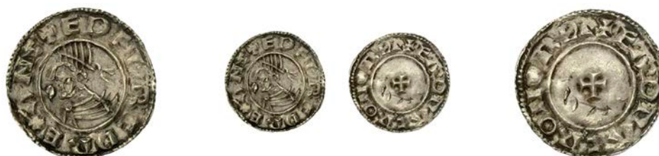
169 Penny, Last Small Cross type, Norwich, Eadwacer, EADPACR O NORDP, 1.39g/10h (SCBI Copenhagen 1008, E Anglia 1208 and Doubleday 382, same dies; BEH 3119; N 777; S 1154). Wavy flan, some peckmarks, otherwise very fine, toned £150-£180

Provenance: E.L. Judson Collection, Part II, DNW Auction 55, 8 October 2002, lot 1042; J.R. Hulett Collection, Part VIII, DNW Auction 154, 3 December 2018, lot 8