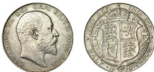
406 Halfcrown, 1910 (ESC 3576; S 3980). Extremely fine