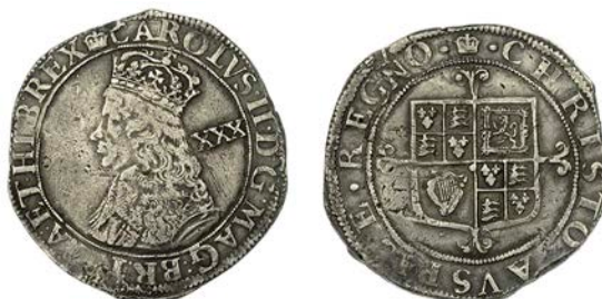
263 Third issue, Halfcrown, mm. crown, reads MAG BRI FRA, 14.95g/10h (ESC 298; N 2761; S 3321). Some surface marks, otherwise good fine