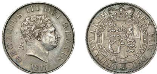
339 Halfcrown, 1817, small head (ESC 2096; S 3789). Extremely fine, toned