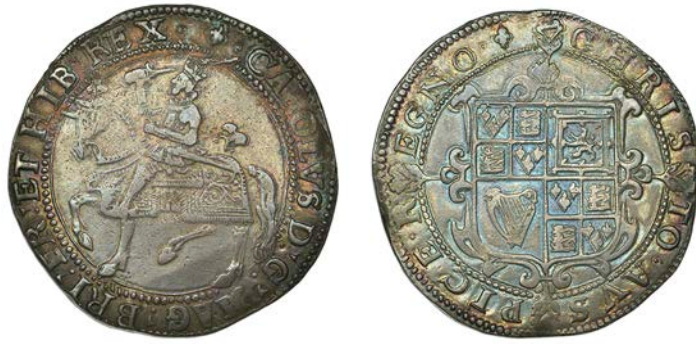
95 Tower mint, Crown, Gp I, type 1a, mm. lis, 29.99g/1h (FRC III/I [Sale, lot 41]; SCBI Brooker 231, same dies; N 2190; S 2753). About very fine, toned £1,200-£1,500