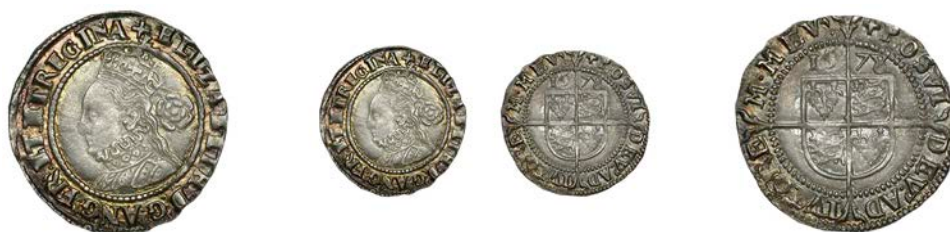
76 Fifth issue, Threepence, 1578, mm. Greek cross, bust 4D, 1.52g/8h (DIG 2G; N 1998; S 2573). Nearly extremely fine, attractively toned