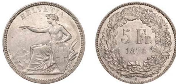
692 Confederation , 5 Francs, 1874b., Brussels (HMZ 1197e; KM. 11). About extremely fine