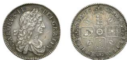
277 Shilling, 1663, first bust (ESC 500; S 3771). Scratch on face and smoothed in field, otherwise better than very fine, toned