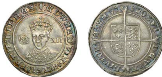
65 Third period, Fine issue, Shilling, mm. tun, crown with plain caul, 6.21g/12h (N 1937; S 2482). A full, round coin, attractively toned, extremely fine or better, very rare £700-£900