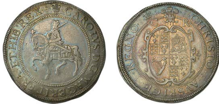
96 Tower mint, Crown, Gp II, type 2b1, mm. plume, rev., plume between c r above shield, 29.56g/10h (FRC IX/XIII [Sale, lot 56]; SCBI Brooker 242, same dies; N 2192; S 2756). About very fine, reverse better, toned £1,200-£1,500