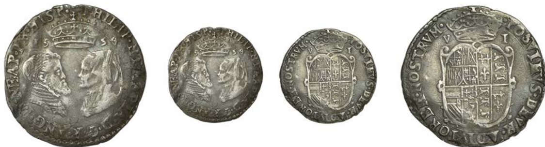
70 Sixpence, 1554, full titles, 3.06g/7h (N 1970; S 2505). Creased and scratch on obverse, otherwise about very fine, good portraits £500-£700