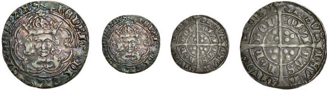
48 Facing Bust issue, Groat, class IIIc, London, mm. anchor [inverted on obv. , upright on rev. ], 3.00g/6h (SCBI Ashmolean 365ff; N 1705c; S 2199A). Nearly very fine, toned £120-£150