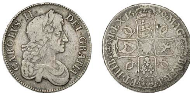
274 Crown, 1679, third bust, edge TRICESIMO PRIMO (ESC 403; S 3358). Good fine