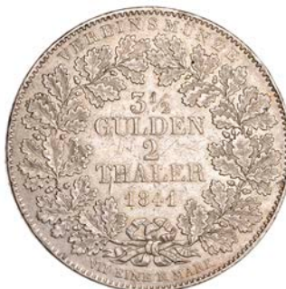
597 FRANKFURT, Free City , Double-Thaler, 1841 (Dav. 641; KM. 329). Some contact marks, otherwise about extremely fine