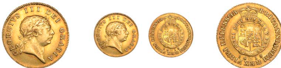
G 313 Half-Guinea, 1813, seventh bust (EGC 859; S 3737). Good very fine £300-£400