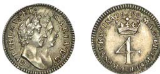
282 Fourpence, 1690 (ESC 883; S 3439). Extremely fine £100-£120