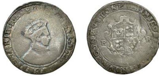
62 Second period, 6 oz. issue, Shilling, undated, Durham House, mm. bow, bust 2, frosted garniture, wire-line inner circles, 4.72g/6h (Bispham 5F; N 1924; S 2472). Scored on reverse, otherwise nearly fine, scarce £100-£120