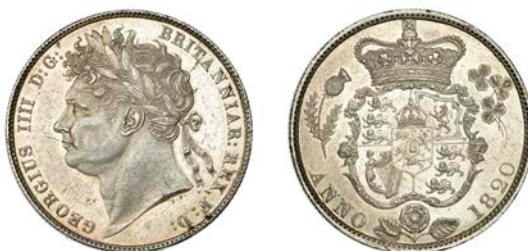
360 Halfcrown, 1820 (ESC 2357; S 3807). Light surface marks, otherwise good extremely fine, reflective fields £300-£400