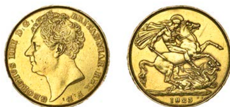
G 346 Two Pounds, 1823, edge iv (S 3798). Removed from a mount and gilt, very fine