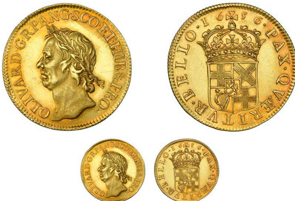
259 Broad, 1656, 9.04g/6h (Lessen A2; WR 39; N 2744; S 3225). Some minor surface marks and hairlines, otherwise good extremely fine with brilliant fields and reddish tone £22,000-£26,000