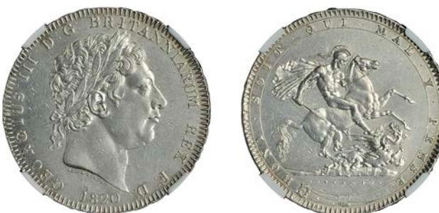
335 Crown, 1820, edge LX (ESC 2016; S 3787). Cleaned, some contact marks, otherwise extremely fine [slabbed NGC UNC Details, Surface Hairlines]