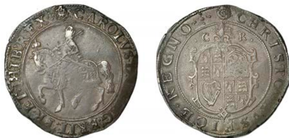
98 Tower mint, Halfcrown, Gp II, type 2a, mm. rose (over plume on obv.), rev. large lis over [?] lis between c r, 15.02g/4h (Bull 132a/10a; SCBI Brooker 303, same obv. die; N 2205; S 2769). Obverse weak in centre and lightly scratched, otherwise good fine, toned £120-£150