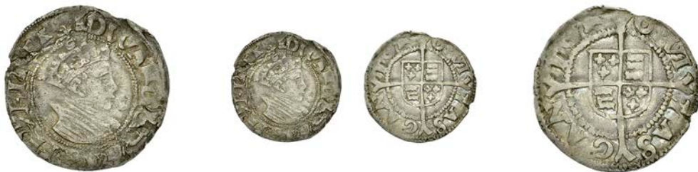
210 First Period, Halfgroat, Canterbury, no mm., reads EDWARD and CIVITAS CANTOR, 1.31g/10h (N 1901; S 2459). Good fine, portrait better, lightly toned, the obverse legend variety rare £300-£400