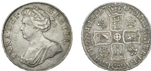
292 Crown, 1707, roses and plumes, edge SEXTO (ESC 1343; S 3578). Some minor marks, otherwise very fine £400-£500