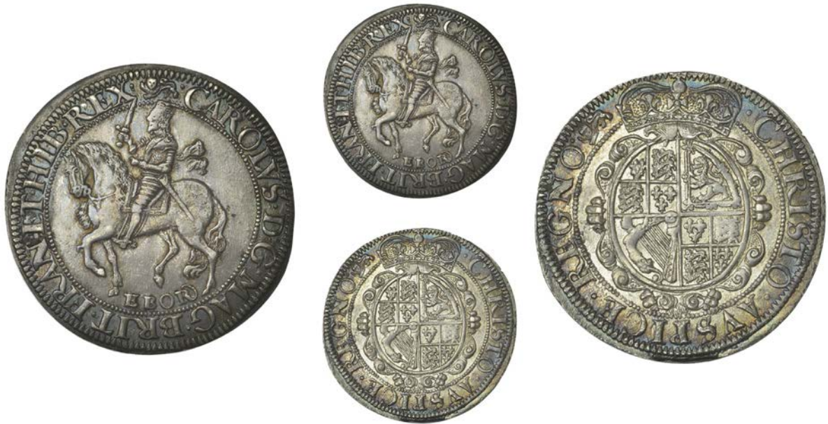
129 York mint, Halfcrown, Gp 2 [type 7], mm. lion, horse's tail between legs, rev. oval garnished shield, 13.84g/12h (Bull 560; Besly 2E; cf. SCBI Brooker 1086-8; N 2315; S 2869). About extremely fine, toned £800-£1,000