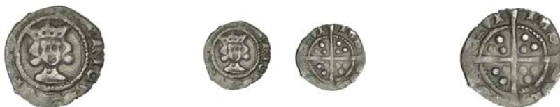
192 Heavy coinage, Halfpenny, London, 0.59g/6h (Withers 3; N 1352-3; S 1723-4). Good fine or better £200-£260