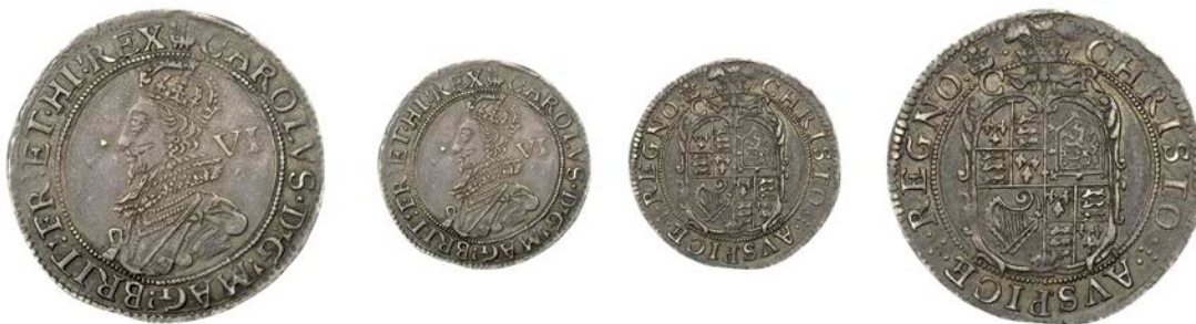
238 Tower mint, Sixpence, Gp C, mm. plume, rev. plume over shield, 2.92g/11h (SCBI Brooker 592A, this coin ; N 2239; S 2810). Good very fine, attractively toned; a piece of fine work £1,000-£1,200 Provenance: E.C. Carter Collection; E. Burstal Collection, Glendining Auction, 15-16 May 1968, lot 323; J.G. Brooker Collection; Spink Auction 188, 29 March 2007, lot 404