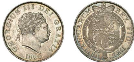
343 Halfcrown, 1820 (ESC 2105; S 3788). Light surface marks, otherwise better than extremely fine