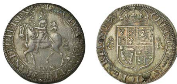
130 York mint, Halfcrown, Gp 3 [type 5], mm. lion, rev. square-topped shield, 14.53g/12h (Bull 568; Besly 3A; SCBI Brooker 1081, same dies; N 2313; S 2867). Flan flaws both sides, otherwise good very fine £600-£800