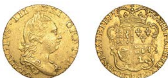
x 311 Half-Guinea, 1776, fourth bust (EGC 816; S 3734). Edge filed [?] above 76 of date and a few surface marks, otherwise better than very fine