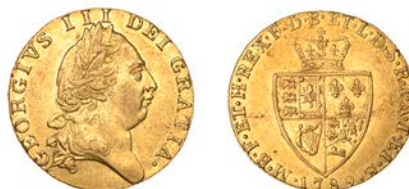
x 307 Guinea, 1789, fifth bust (EGC 716; S 3729). Good very fine