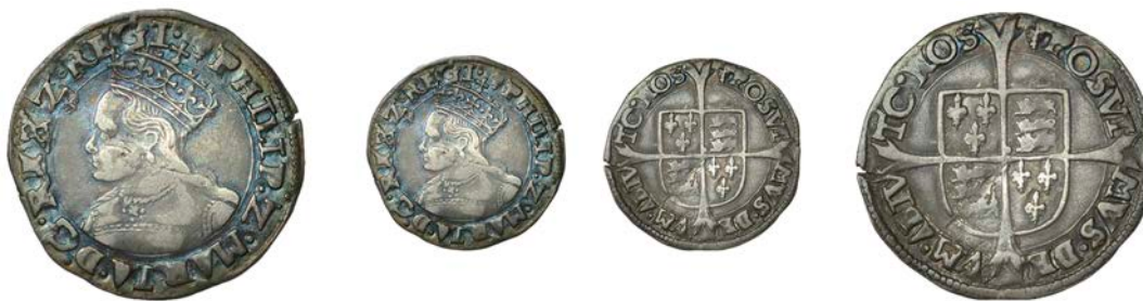
71 Groat, mm. lis, 2.26g/12h (N 1973; S 2508). Nearly very fine