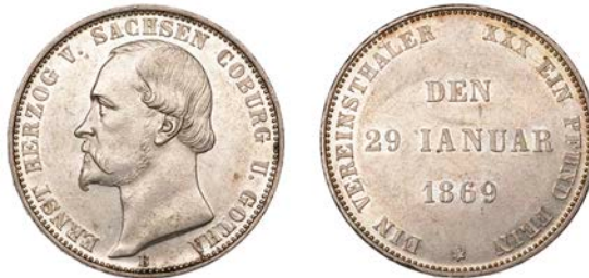
608 Saxe-Coburg-Gotha, Ernst II , Thaler, 1869 B (Dav. 827; KM. C122). Lightly cleaned, otherwise extremely fine