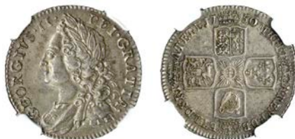
304 Shilling, 1750/46 (ESC 1730; S 3704). Extremely fine, toned [slabbed NGC MS 61]