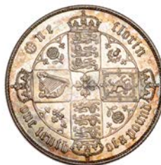
x 398 Florin, 1864, die 64 (ESC 2854; S 3892). Nearly extremely fine, lightly toned