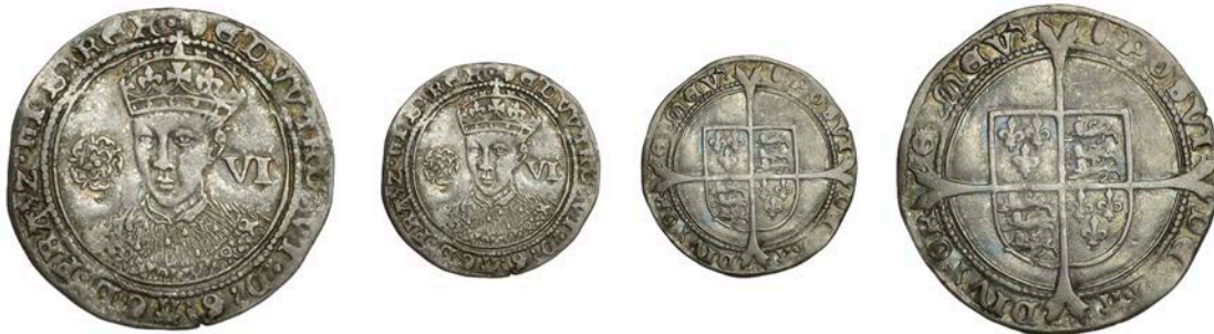
66 Third period, Fine issue, Sixpence, mm. tun, crown with plain caul, 3.09g/4h (N 1938; S 2483). Good very fine £300-£400