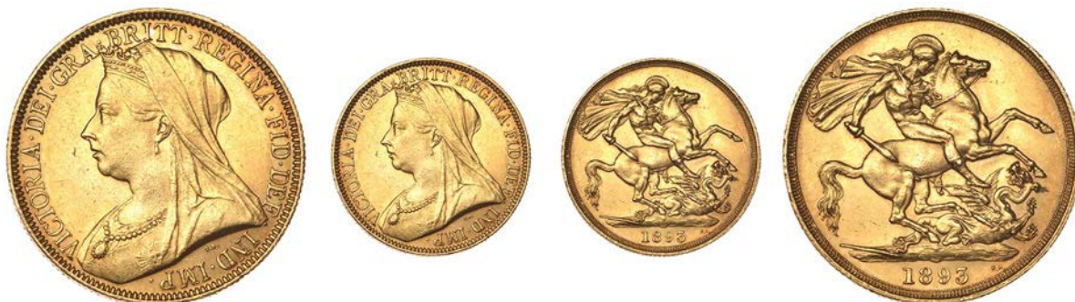
G 374 Two Pounds, 1893 (S 3873). Lightly bagmarked, otherwise extremely fine