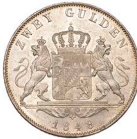
593 BAVARIA, Ludwig I , 2 Gulden, 1848 (Dav. 594; KM. 819). Extremely fine with some toning