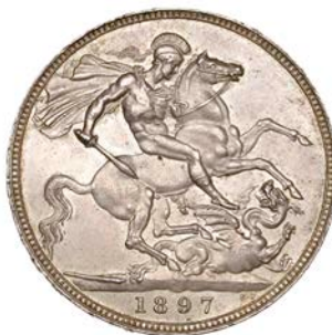
393 Crown, 1897, edge lx (ESC 2602; S 3937). Extremely fine