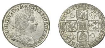
297 Shilling, 1723 ss c, first bust (ESC 1586; S 3647). About as struck £300-£360