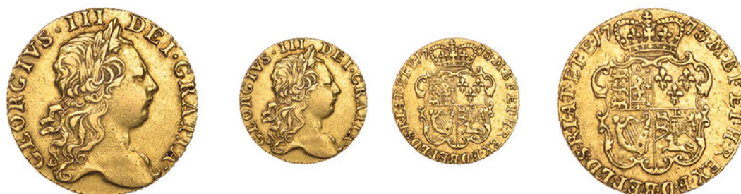
x 190 Guinea, 1773, third bust (EGC 684; S 3727). Lightly cleaned, about very fine