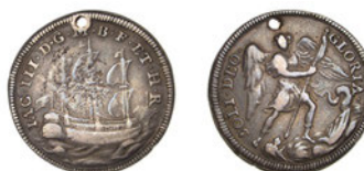
546 James III (the 'Old Pretender') , a silver touchpiece, undated, unsigned [by E. or O. Hamerani], ship sailing right, rev. St Michael spearing dragon, 20mm, 2.76g/12h (Woolf 35, O1/R1). Pierced as usual, some porosity in centres, otherwise very fine £200-£260