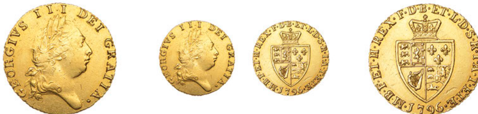
x 198 Half-Guinea, 1796, fifth bust (EGC 839; S 3735). Cleaned, traces of mounting on edge, otherwise very fine £240-£300