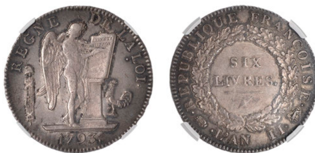
714 Convention, 6 Livres, 1793, AN IIa, Paris (Gad. 58; KM. 624.1; Dav. 1336). Very fine and toned [slabbed NGC XF 45]