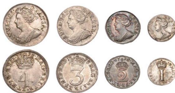
176 Maundy set, 1713 (ESC 1479; S 3599) [4]. About extremely fine or better, Threepence lightly cleaned £300-£400