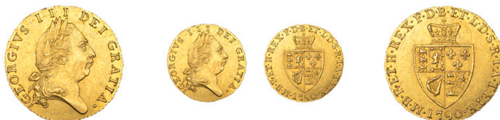
x 196 Half-Guinea, 1790, fifth bust (EGC 833; S 3735). Some minor marks, otherwise extremely fine