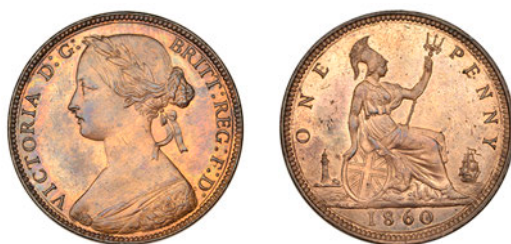
301 Penny, 1860, dies Dd (F 10; BMC 1629; S 3954). Some light lacquering, otherwise better than extremely fine, original colour with bright attractive fields