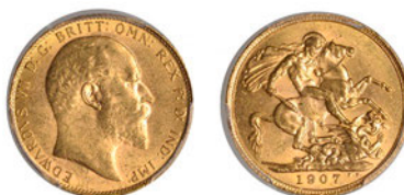
G 310 Sovereign, 1907 (M 179; S 3969). Extremely fine [slabbed PCGS MS 62]