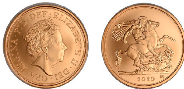
G 326 Five Pounds, 2020, cypher of George III on rev. (Hill F119; S SE13B). Matt, as struck [slabbed PCGS MS 70]