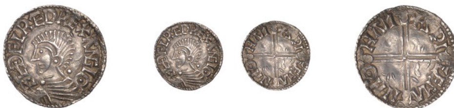
76 Penny, Long Cross type, Southampton, Swilman, SPILEMAN M' O HAM, 1.55g/3h (SCBI Mack 956, same dies; BEH 1273; N 774; S 1151). Minor edge crack at 1 o'clock terminating within the legend, peckmarked and lightly crimped, otherwise very fine and toned; a scarcer mint £400-£500