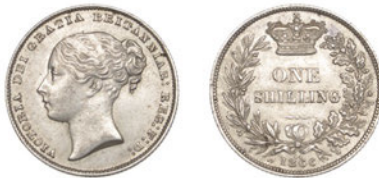
266 Shilling, 1866, die 44 (ESC 3027; S 3905). Nearly extremely fine