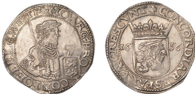
766 WEST FRIESLAND , Rijksdaalder, 1656, 28.67g/4h (Delm. 940; Dav. 4842). Lightly cleaned, otherwise about extremely fine, the date very rare £300-£400