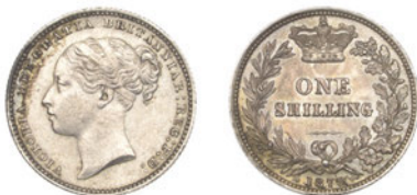
281 Shilling, 1879 (ESC 3061; S 3907). Nearly extremely fine