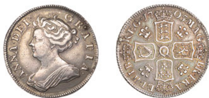
175 Shilling, 1705, plumes (ESC 1392; S 3588). Cleaned at one time and now re-toned, traces of mounting on edge, otherwise good very fine £200-£260