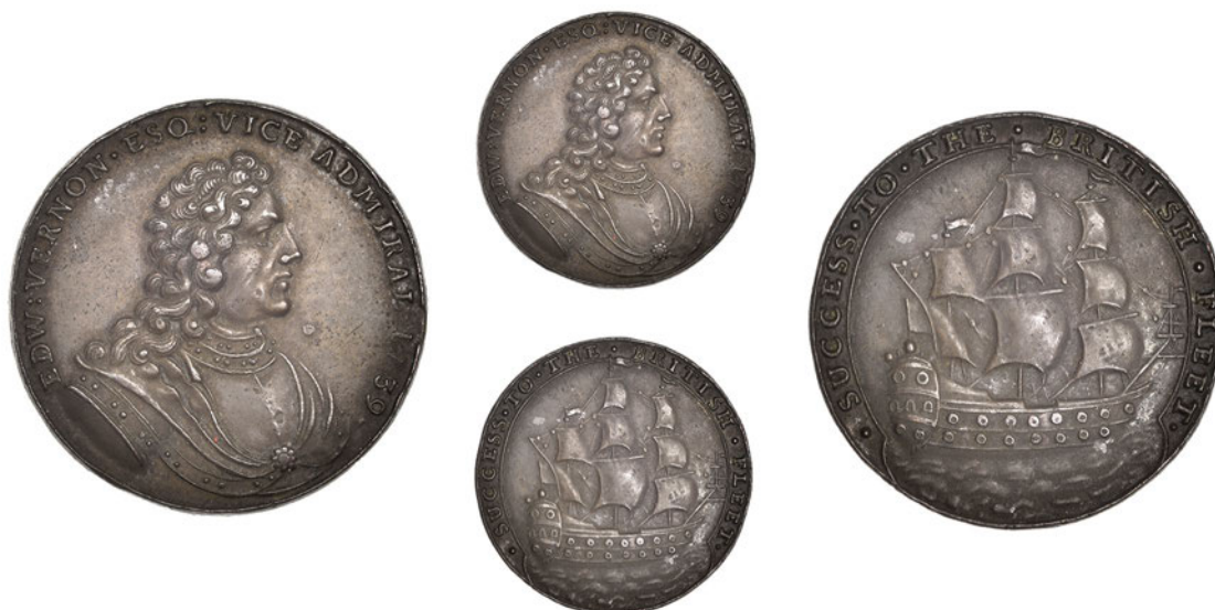
545 Admiral Vernon , 1739, a pinchbeck medal, unsigned, armoured bust of Vernon right, rev. SUCCESS TO THE BRITISH FLEET, ship sailing right, 34mm, 13.52g/6h (Adams NLv 2-B; Betts -; MI pl. cliv, 13; E 551). Good very fine, very rare £1,000-£1,200