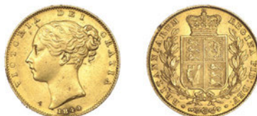
G 240 Sovereign, 1844, wide date (M 27; S 3852). A few edge scuffs, about very fine