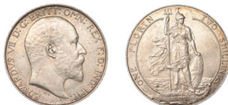
314 Florin, 1909 (ESC 3585; S 3981). About extremely fine