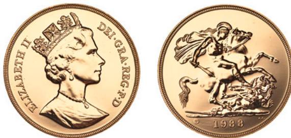
G 323 Five Pounds, 1988 (Hill F53; S SE5). Brilliant, as struck; in case of issue