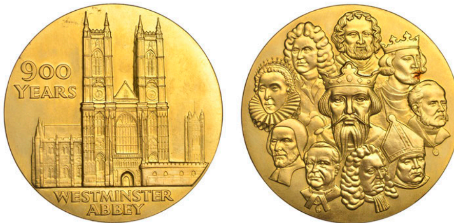
588 900th Anniversary of Westminster Abbey , 1965, a gold medal, unsigned [by M. Rizzello], view of the Abbey, rev. crowned head of Edward the Confessor facing, nine other heads of historical figures around, 57mm, 22ct, 127.68g (E 2107). About as struck; in case of issue £5,000-£7,000 No. 475 of 1000 issued in gold