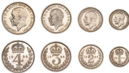
318 Maundy set, 1936 (ESC 3997; S 4043) [4]. About as struck; in case of issue