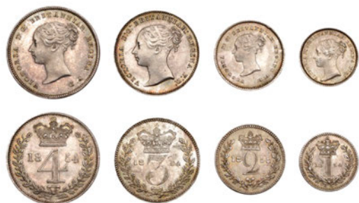
292 Maundy set, 1854 (ESC 3498; S 3916) [4]. Good extremely fine