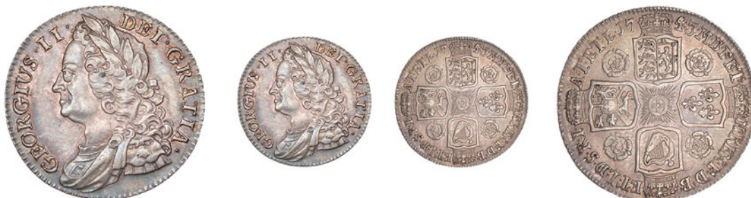
x 185 Shilling, 1743, roses (ESC 1720; S 3702). Extremely fine and toned