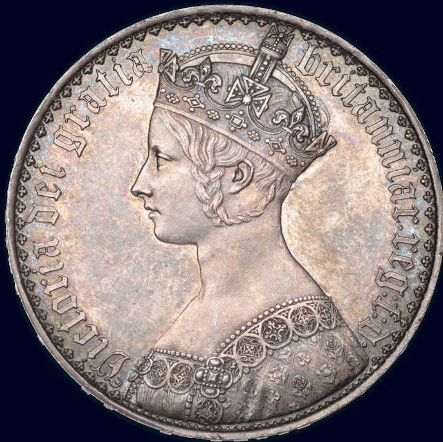
FEATURED ABOVE LOT 250 GOTHIC CROWN 1847