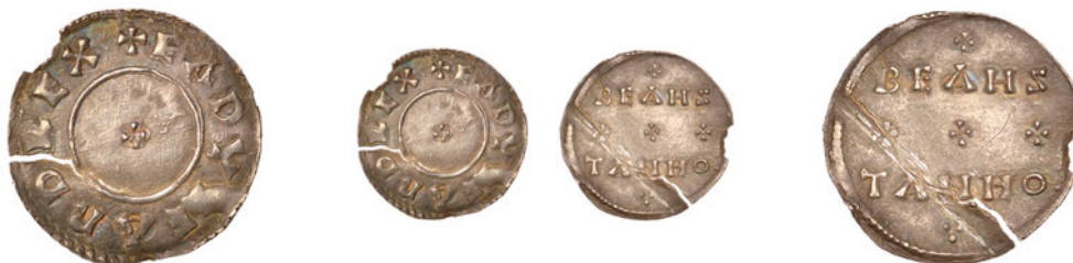
70 Penny , Two Line type [HCT 1], Beagstan, EADVVEARD REX + around small cross pattée, rev. BEAHS TAN MO in two lines divided by three crosses pattée, cross pattée above, trefoil below, 1.54g/11h (CTCE 85; SCBI East Anglia 134; BMC 17; N 649; S 1087). Very fine, but creased and badly cracked £260-£300