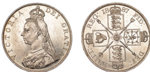
253 Double Florin, 1887, Roman I in date (ESC 2695; S 3922). A few minor marks, otherwise about as struck £100-£120