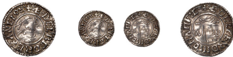
72 Penny, First Hand type, Southampton, Æthelweard, ÆDELPERD M' O HAMPIC., South A style, no pellet above hand, 1.60g/12h (Dolley & Talvio 97; SCBI Copenhagen 411, same dies; BEH 1297; N 766; S 1144). Pecked and crimped, otherwise about very fine, very rare £200-£260