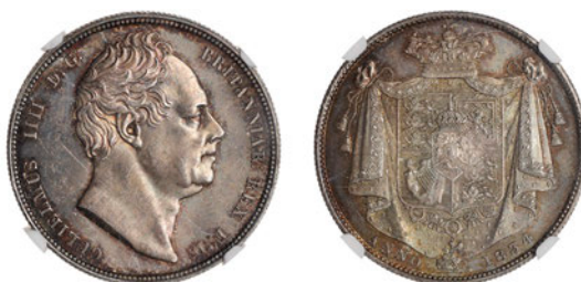
237 Halfcrown, 1834, w.w. in script (ESC 2478; S 3834). Light scratch across neck, otherwise good extremely fine, attractively toned [slabbed NGC Unc Details, Obv Scratched]