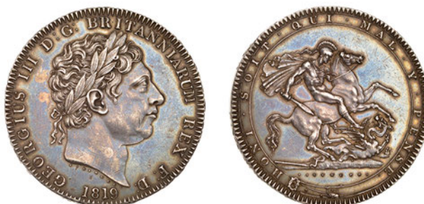
216 Crown, 1819, edge LX, no stop after TUTAMEN (ESC 2013; S 3787). Cleaned, some minor marks, otherwise good very fine £150-£180