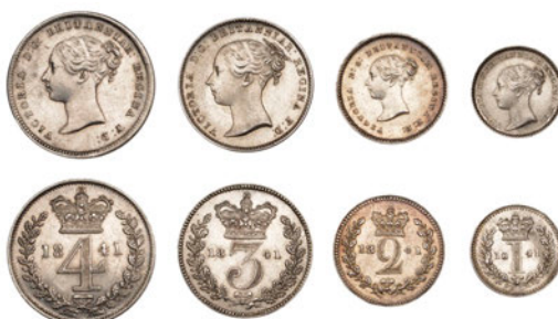
290 Maundy set, 1841 (ESC 3484; S 3916) [4]. Lightly cleaned, otherwise extremely fine or better