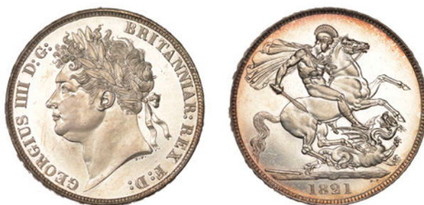
227 Crown, 1821, edge SECUNDO (ESC 2310; S 3805). Cleaned, otherwise good extremely fine £800-£1,000