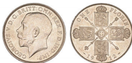
316 Florin, 1912 (ESC 3757; S 4012). Good extremely fine