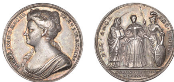
x 543 Queen Caroline, Coronation , 1727, a silver medal by J. Croker, bust left, rev. Queen standing between Religion and Britannia, 35mm, 18.99g (MI II, 480/8; E 512). A few minor marks, good very fine and toned £200-£260