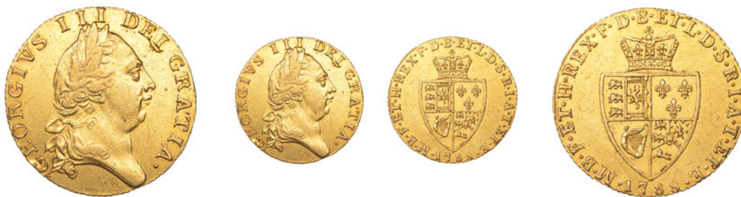
x 191 Guinea, 1788, fifth bust (EGC 713; S 3729). Very fine