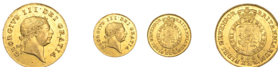
G 200 Half-Guinea, 1809, seventh bust (EGC 854; S 3737). Brushed, minor flecking, otherwise about extremely fine £400-£500