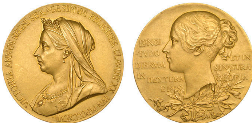
573 Victoria, Diamond Jubilee, 1897 , a gold medal by G.W. de Saulles, veiled bust left, rev. young bust left, 55mm, 92.51g (W & E 3000A.5; BHM 3506; E 1817a). A few light marks, otherwise extremely fine; in case of issue £4,000-£5,000