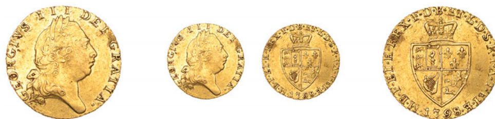
x 199 Half-Guinea, 1798/7, fifth bust (EGC 843; S 3735). Cleaned, slightly bent, some light scratches, otherwise good very fine £300-£400