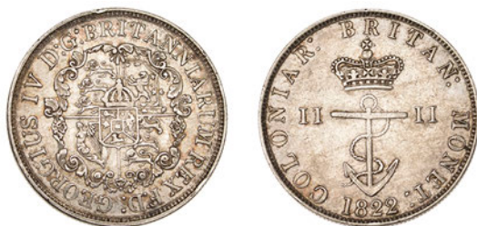
683 George IV, Anchor money, Half-Dollar, 1822 (Prid. 8; KM. 4). Lightly cleaned, very fine