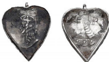
540 Marriage of Charles II and Catherine of Braganza , 1662, a heart-shaped silver locket, crowned bust of Charles left, engraved C R at sides, rev. bust of Catherine left with long hair and wearing a crown mounted at the back of her head, engraved K R at sides, 26 x 21mm. Very fine, complete with loop £300-£400