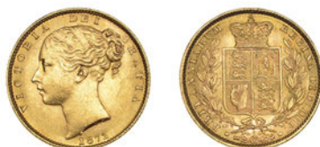
G 244 Sovereign, 1872, die 7 (M 56; S 3853B). Extremely fine