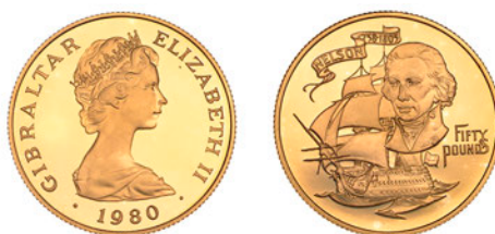
G 738 Elizabeth II , Proof 50 Pounds, 1980 (KM. 13; F 4). Minor spotting, otherwise brilliant, about as struck; in case of issue £600-£800