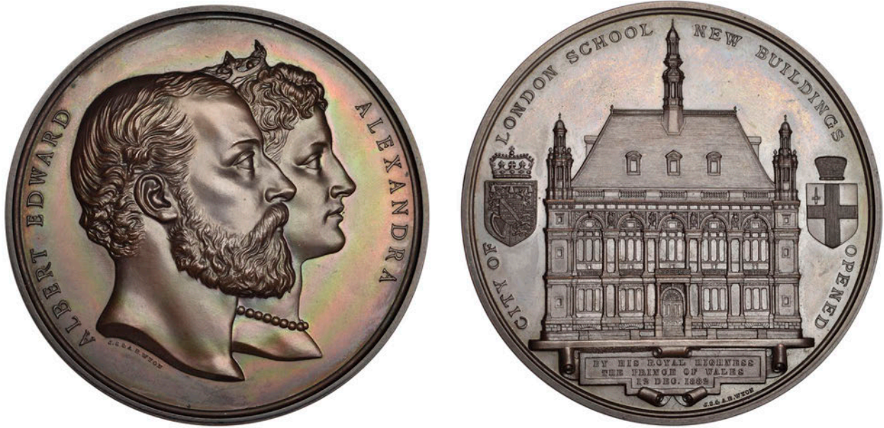
570 City of London School, New Buildings Opened, 1882 , a bronze medal by J.S. & A.B. Wyon for the Corporation of the City of London, conjoined busts of the Prince and Princess of Wales right, rev. frontal elevation of the School, 77mm (W & E 1461A.1; BHM 3133; E 1690). Good extremely fine £200-£260