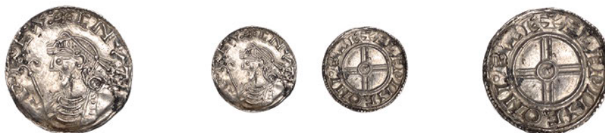
83 Penny, Short Cross type, Chester, Elfwine, ELEPINE ON LEICE, 1.16g/6h (SCBI Copenhagen 1385; BEH 1335; N 790; S 1159). Some light surface deposits, otherwise good very fine, neatly struck £300-£360