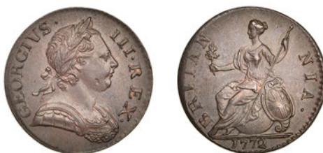
210 Halfpenny, 1772, rev. A, ball below spear blade (BMC 901; S 3774). About extremely fine £100-£120