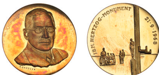
628 SOUTH AFRICA, Hertzog Monument, 1968, a gold medal by T. Sasseen, facing bust of General Hertzog, rev. view of the monument, 33mm, 18ct, 30.93g. About as struck; in case of issue £800-£1,000