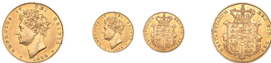
G 225 Half-Sovereign, 1828 (M 409; S 3804). Some minor marks, otherwise very fine £240-£300