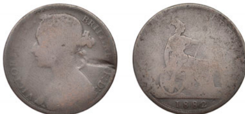
304 Penny, 1882, dies Pr (Gouby A; F 112; BMC -; S 3954). Poor, extremely rare