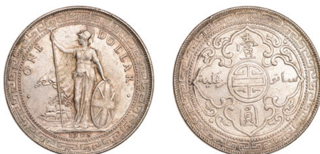
687 Trade Dollar, 1908 B (Prid. 18; KM. T5). Extremely fine [slabbed NGC MS 62]