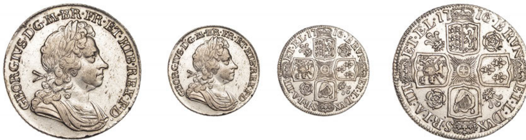
178 Shilling, 1716, roses and plumes (ESC 1562; S 3645). Cleaned, otherwise about extremely fine, rare