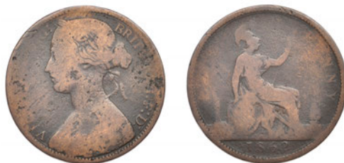
303 Penny, 1862, dies Jg, B of BRITT over R (Gouby H; F -; BMC -; S 3954). Only fair but extremely rare