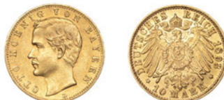
G 725 BAVARIA, Otto, 10 Marks, 1893 D (KM. 911; F 3770). Very fine £150-£180