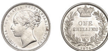
280 Shilling, 1874, die 9 (ESC 3044; S 3906A). Better than extremely fine