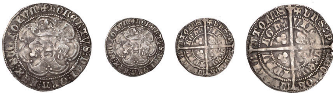
354 Heavy coinage, Groat, Edinburgh, first issue, mm. cross pattée, tall bust in tressure of seven arcs, pellets at cusps, triple pellet stops on obv. , double saltire stops on rev. , 2.83g/8h (SCBI 35, 533ff; B 4, fig. 344; S 5164). Nearly very fine, toned £300-£400