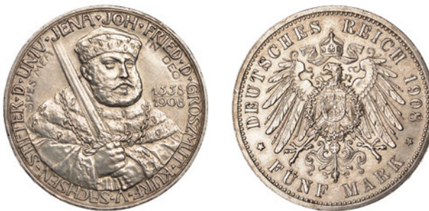
734 SAXE-WEIMAR-EISENACH, Wilhelm Ernst , 5 Marks, 1908, 350th Anniversary of Jena University (Dav. 849; KM. 220). Lightly cleaned, about extremely fine £120-£150