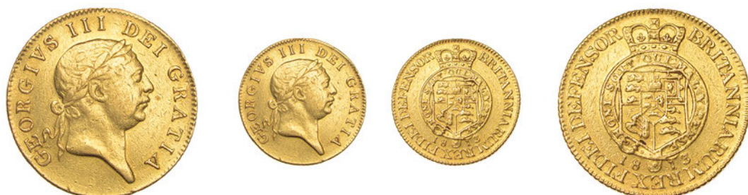
G 195 Guinea, 1813, sixth bust (EGC 737; S 3730). Cleaned, numerous contact marks, traces of mounting on edge, otherwise about very fine