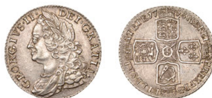
186 Shilling, 1758 (ESC 1734; S 3704). About extremely fine