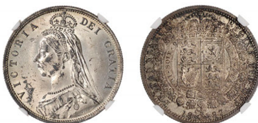
257 Halfcrown, 1887, Jubilee head (ESC 2771; S 3924). Some surface staining, otherwise good extremely fine [slabbed NGC MS 62] £100-£120