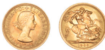
G 327 Sovereign, 1966 (M 304; S 4125). Extremely fine