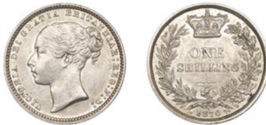
274 Shilling, 1870, die 7 (ESC 3038; S 3906A). Extremely fine