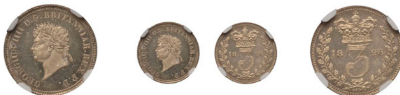
232 'Mule' Threepence, 1828, small head (Davies -; ESC -; S -). Two minor flan irregularities, otherwise brilliant and much as struck with prooflike features; seemingly unlisted in the standard references and excessively rare thus [slabbed NGC MS 64 PL] £3,000-£4,000