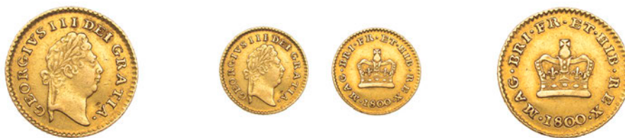
G 201 Third-Guinea, 1800, first bust (EGC 870; S 3738). Lightly cleaned, dig in obverse field, otherwise very fine £200-£260