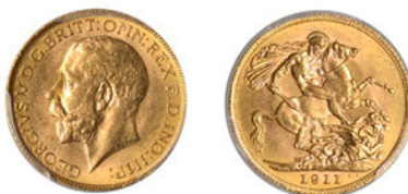
G 696 George V, Sovereign, 1911 C (M 221; S 3997). Extremely fine [slabbed PCGS MS 63]