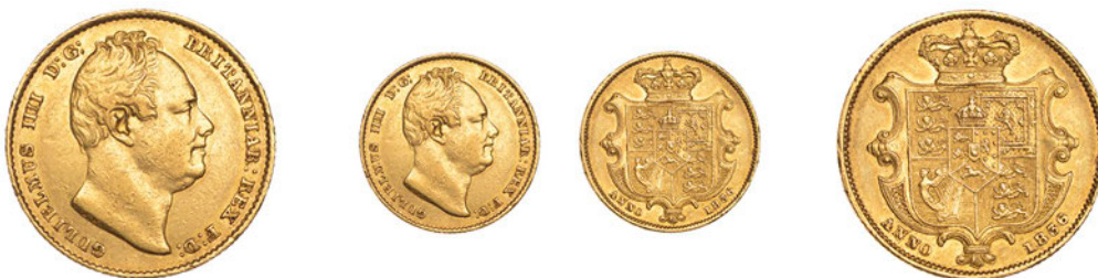
G 235 Sovereign, 1836 (M 20; S 3829B). Some minor marks, otherwise very fine, reverse better