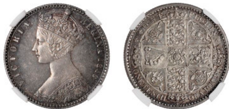
258 Florin, 1849, with initials (ESC 2815; S 3890). Some surface marks, otherwise good extremely fine, dark tone over reflective fields [slabbed NGC MS 62] £200-£300