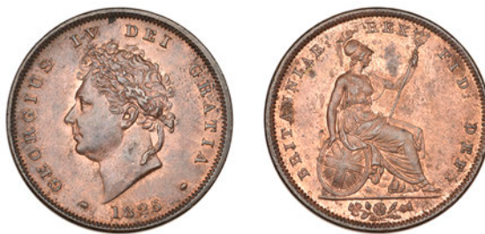
233 Penny, 1825 (BMC 1420; S 3823). Minor spotting, otherwise about extremely fine with original colour