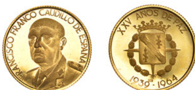
629 SPAIN, 25 Years of Peace, 1964, a gold medal, bust of General Franco facing three-quarters left, rev. crowned arms on wreath, 24mm, 22ct, 6.99g. About as struck; in case of issue £240-£300