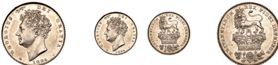
231 Proof Sixpence, 1826, type 3, edge grained, 2.83g/6h (ESC 2435; S 3815). Cleaned, some minor marks, otherwise extremely fine £300-£400