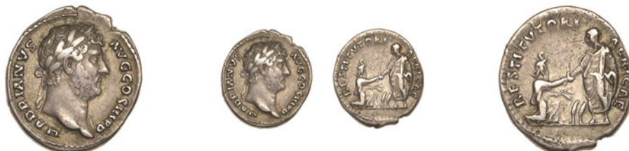
988 Hadrian , Denarius, 130-3, laureate bust right, slight drapery on far shoulder, rev. Hadrian standing left, holding volumen, about to raise Africa who is kneeling right, holding grain ears and wearing elephant skin headdress; between them, stalks of grain, 3.41g (RIC 1569; RSC 1223a). About very fine £100-£120