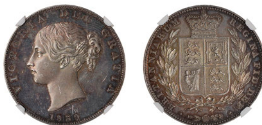
256 Proof Halfcrown, 1839, one plain and one ornate fillet, ww in relief, edge plain, 6h (ESC 2708; S 3885). A few light marks, otherwise good extremely fine, blueish toning over reflective fields [slabbed NGC PF 62 Cameo] £3,400-£4,000