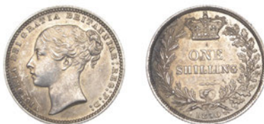
272 Shilling, 1870, die 2 (ESC 3038; S 3906A). About extremely fine