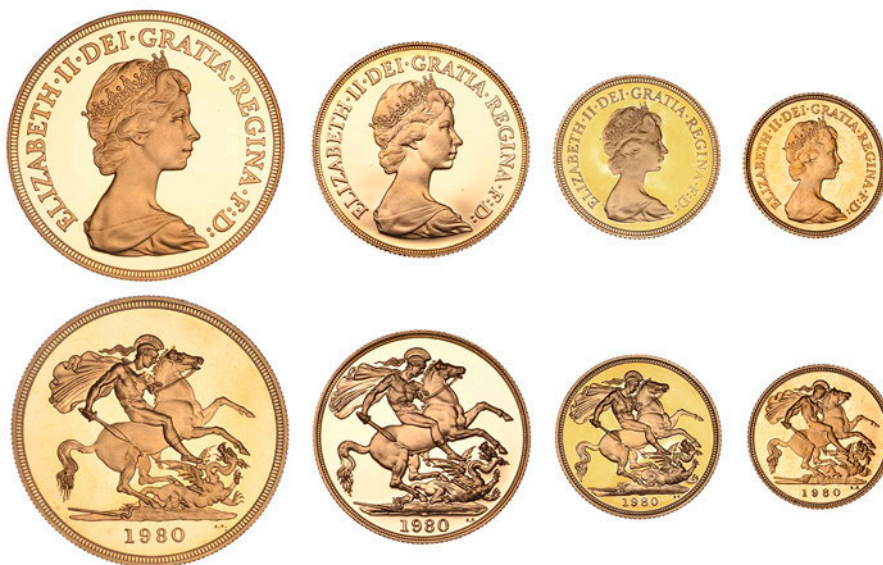
G 342 Proof set, 1980, comprising gold Five Pounds, Two Pounds, Sovereign and Half-Sovereign [4]. Brilliant, as struck; in case of issue £2,400-£3,000