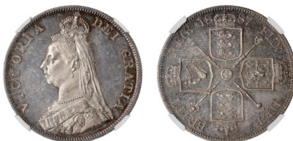
255 Proof Double Florin, 1887, Arabic 1 in date (ESC 2698; S 3923). Trifling surface marks, otherwise about as struck, richly toned [slabbed NGC PF 63 Cameo] £700-£900