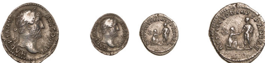
989 Hadrian , Denarius, 130-3, laureate bust right, rev. Emperor standing left, about to raise Hispania kneeling right and holding branch, rabbit between them, 2.71g (RIC 1580; RSC 1260; RCV 3535). Better than very fine £150-£180