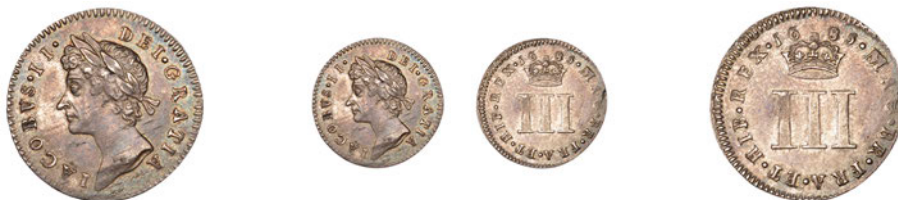
160 Threepence, 1685, 3h (ESC 794; S 3415). About extremely fine, rare