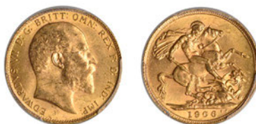
G 308 Sovereign, 1906 (M 178; S 3969). Extremely fine [slabbed PCGS MS 62]