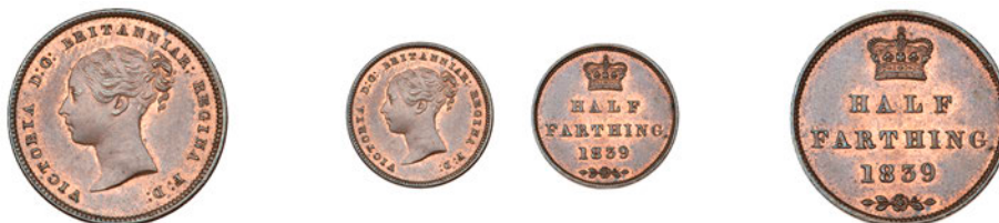
306 Half-Farthing, 1839 (BMC 1590; S 3951). Good extremely fine with some original colour