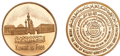
625 KUWAIT, Liberation of Kuwait, 1991, a gold medal, legend in centre and in three concentric circles around, rev. view of important Kuwaiti buildings, 28mm, 17.04g/12h. Brilliant, as struck; in case of issue £600-£800