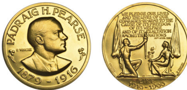
589 50th Anniversary of the Easter Rising , 1966, a gold medal by P. Vincze, bust of Padraig Pearse right, rev. kneeling male and seated female with flags, legend in field, 38mm, 22ct, 62.96g, edge stamped 311 (E 2109b). Fields lightly hairlined, a few tiny scratches, otherwise good extremely fine; in case of issue £2,400-£3,000