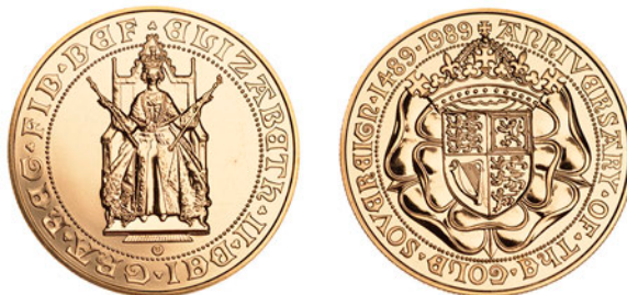
G 324 Five Pounds, 1989 (Hill F55; S SE6A). About as struck; in case of issue