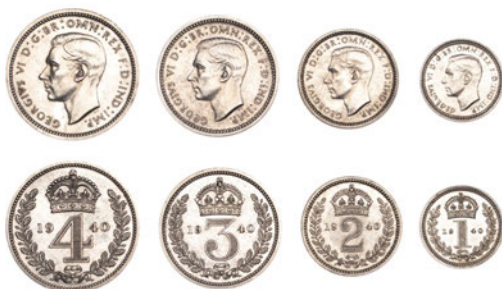
320 Maundy set, 1940 (ESC 4309; S 4086) [4]. About as struck; in case of issue