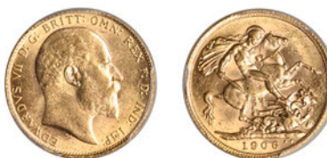
G 309 Sovereign, 1906 (M 178; S 3969). Extremely fine [slabbed PCGS MS 61]