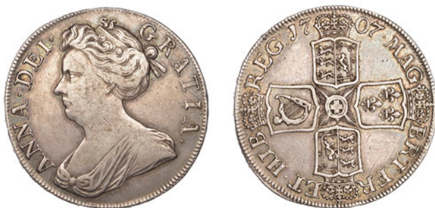
173 Crown, 1707, edge SEPTIMO (ESC 1344; S 3601). Lightly cleaned at one time, otherwise very fine £400-£500