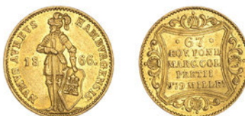
G 728 HAMBURG, Free City, Ducat, 1866 (KM. 579; F 1142). Lightly scratched on reverse, otherwise good very fine £150-£180