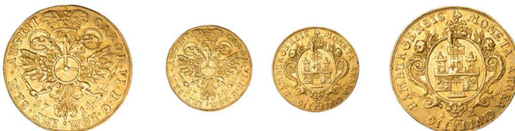
x 727 HAMBURG, Free City, Ducat, 1714 IR , 3.45g/12h (KM. 342; F 1120). Good very fine, very rare £2,000-£2,600