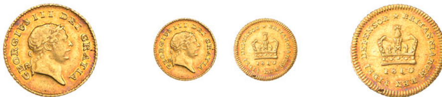
G 204 Third-Guinea, 1810, second bust (EGC 879; S 3740). Very fine, toned £200-£260