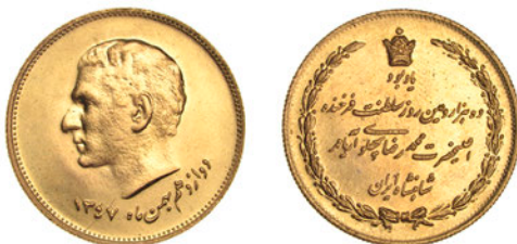
623 IRAN, Muhammad Reza Pahlavi, SH1347 [1968-9], a gold medal, bare head left, rev. legend within wreath, 30mm, 20.41g. Extremely fine £700-£900