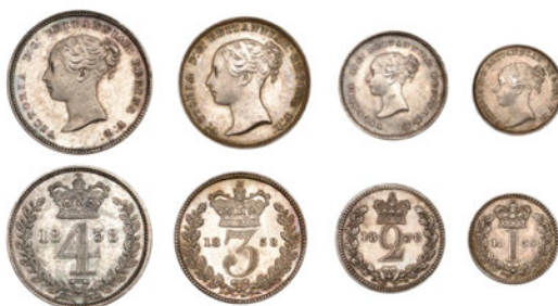
289 Maundy set, 1838 (ESC 3478; S 3916) [4]. Extremely fine or better