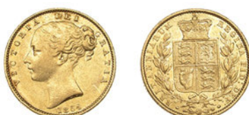
G 242 Sovereign, 1854, w.w. in relief on truncation (M 37A; S 3852C). Very fine, rare