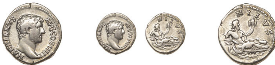
987 Hadrian , Denarius, 130-3, bare-headed bust right, rev. Nilus reclining right holding reed and cornucopiæ, crocodile below, 3.33g (RIC 1544; RSC 989; RCV 3508). About very fine £100-£120