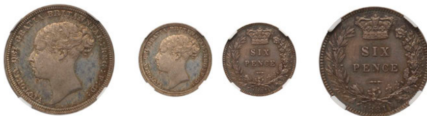
284 Proof Sixpence, 1881, plain edge, 12h (Davies 1099E; ESC 3253; S 3912). Attractive mottled toning, brilliant and much as struck [slabbed NGC PF 64]