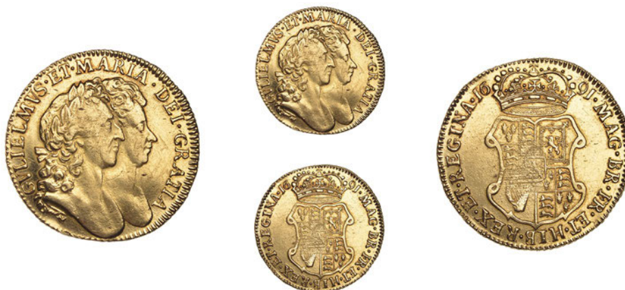
x 161 Guinea, 1691 (EGC 367; S 3426). Has been lightly cleaned at some time, a little weak on the shield, otherwise better than very fine, attractive