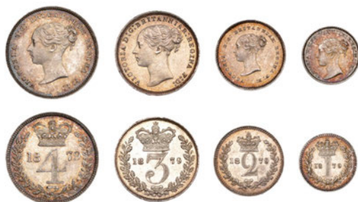
295 Maundy set, 1879 (ESC 3533; S 3916) [4]. Light scratches on obverse of Twopenny, otherwise extremely fine or better with matching tone; in contemporary fitted case