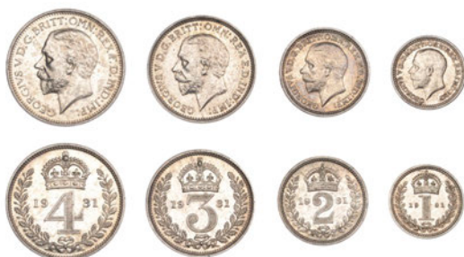
317 Maundy set, 1931 (ESC 3991; S 4043) [4]. About as struck; with plastic holder

Provenance: D. Marshall Collection, DNW Auction 194, 7-8 September 2021, lot 443