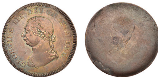
213 A uniface bronze striking of the obv. for a Pattern Dollar, laureate bust left with five berries in wreath, two mullets on truncation, edge plain, 20.19g (ESC obv. K). Weak in parts, very fine, rare £200-£260