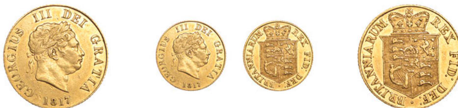
G 215 Half-Sovereign, 1817 (M 400; S 3786). Lightly cleaned, otherwise good very fine £300-£400