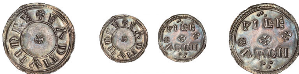
71 Penny , Two Line type [HT 1], Wigearð, EADMVND RE around small cross, rev. PIGEARD N in two lines divided by three crosses, trefoils of pellets above and below, 1.11g/9h (CTCE 92; BMC 135; N 688; S 1105). Good very fine and attractively toned £800-£1,000