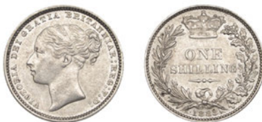
282 Shilling, 1883 (ESC 3072; S 3907). Extremely fine or better