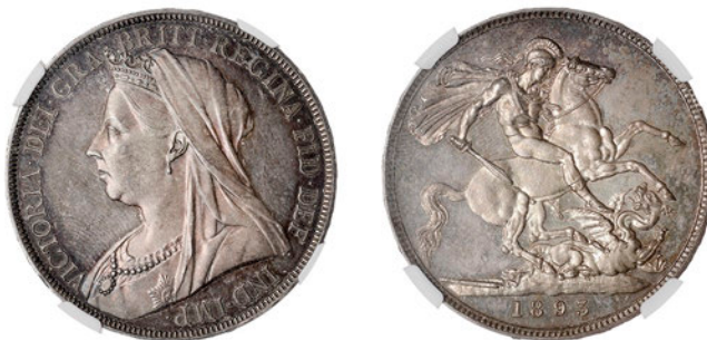
252 Proof Crown, 1893, edge LVI (ESC 2594; S 3937). Very lightly hairlined, otherwise about as struck, dark tone [slabbed NGC PF 63 Cameo] £1,500-£1,800