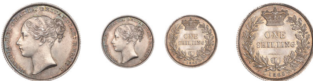
261 Shilling, 1860, 8 of date re-cut (ESC 3018; S 3904). Extremely fine and toned, scarce £400-£500