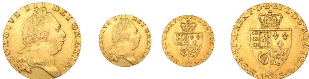
x 193 Guinea, 1793, fifth bust (EGC 723; S 3729). Very fine