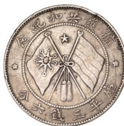
704 REPUBLIC, Yunnan, 50 Cents, undated [1917] (L & M 863; KM. Y479). Edge bruise, otherwise very fine [slabbed NGC XF Details, Rim Damage] £200-£260