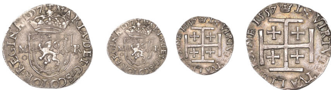
356 First period, Testoon, type IIIb, 1557, mm. cross potent on obv. , crown on rev. , wide low-arched crown, annulets below MR , 5.96g/9h (SCBI 35, 1013; SCBI 58, 344, same dies; B. 18, fig. 793; S 5407). Very fine or better, toned £800-£1,000