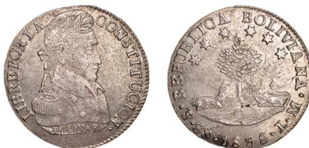
675 Republic , 8 Soles, 1838 LM , Potosí (KM. 97). Lightly cleaned, a little scuffed and minor flan flaws on reverse, otherwise extremely fine £150-£180