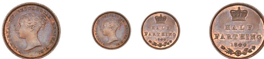
307 Half-Farthing, 1844, E of REGINA over N (BMC 1595; S 3951). Extremely fine, scarce