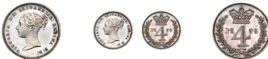
297 Proof Maundy Fourpence, 1839, 1.91g/12h (S 3917 var.). Fields lightly hairlined, otherwise good extremely fine, rare