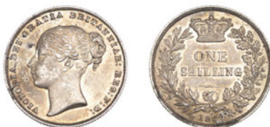
268 Shilling, 1867, die 7 (ESC 3030; S 3905). Extremely fine, a few dark spots