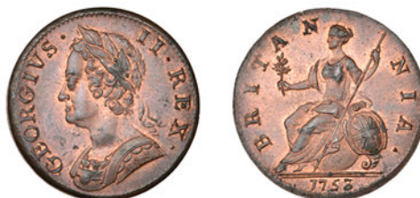
187 Halfpenny, 1753 (BMC 883; S 3719). Minor staining, otherwise extremely fine with original colour