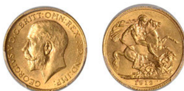
G 315 Sovereign, 1912 (M 214; S 3996). Extremely fine [slabbed PCGS MS 63]