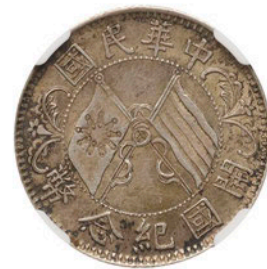
702 REPUBLIC, Sun Yat-sen, 20 Cents, undated (L & M 61; KM. Y317). About extremely fine [slabbed NGC AU 58] £1,200-£1,500