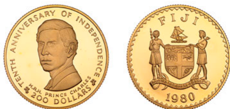
G 711 Elizabeth II, Proof 200 Dollars, 1980 (KM. 47; F 4). Brilliant, as struck; in case of issue