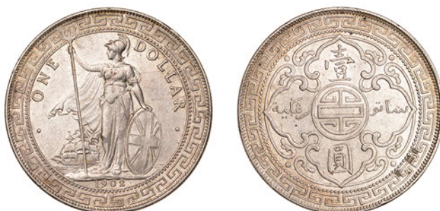
686 Trade Dollar, 1902 B (Prid. 13; KM. T5). Minor marks on edge, otherwise about extremely fine [slabbed NGC AU 58]