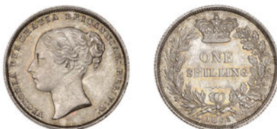
262 Shilling, 1865, die 34 (ESC 3025; S 3905). Extremely fine and toned £120-£150