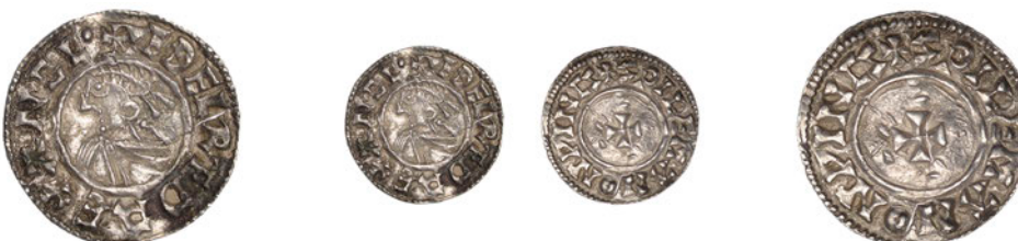
80 Penny, Last Small Cross type, Winchester, Swilman, SPILEMAN ON PINCS, Winchester C dies, reads ANGL', 1.28g/3h (Lyon, BNJ 1998, pp.22-3; Winchester Mint 896; BEH 4313; N 777; S 1154). Cracked through centre, good fine £90-£120