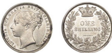
275 Shilling, 1870, die 12 (ESC 3038; S 3906A). Better than extremely fine but some deposit on obverse rim