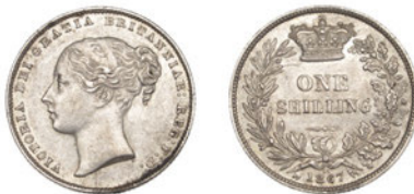
270 Shilling, 1867, die 15 (ESC 3030; S 3905). About extremely fine, reverse better