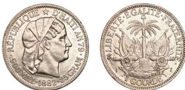
739 Republic , Gourde, 1882 (KM. 46). Cleaned, otherwise extremely fine £80-£100