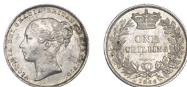
265 Shilling, 1866, die 30 (ESC 3027; S 3905). Extremely fine, a few light surface stains £120-£150

all lots are illustrated on our website and are subject to extra charges which may be viewed in Ts and Cs 3, 4 and 10 at the back of this catalogue