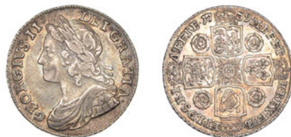
184 Shilling, 1739, roses, larger lettering on obv. (ESC 1716; S 3701). Very fine and toned