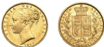
G 241 Sovereign, 1852 (M 35; S 3852C). Some minor marks, otherwise good very fine