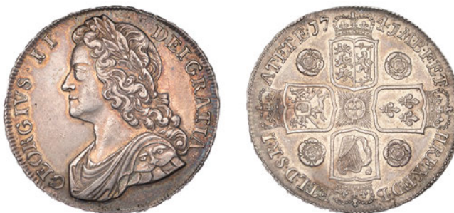
x 181 Crown, 1741, roses, edge DECIMO QUARTO (ESC 1666; S 3687). Cleaned at one time, obverse re-toned, minor marks in fields, otherwise good very fine