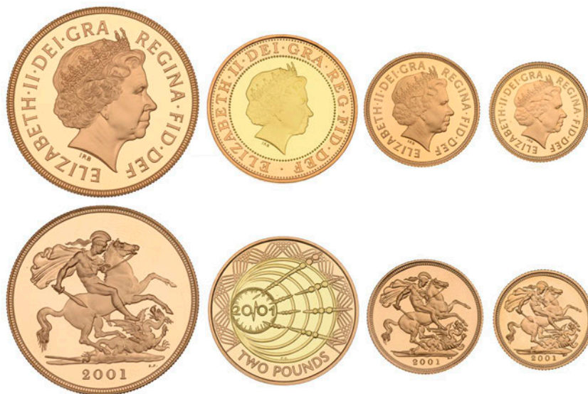
G 344 Proof set, 2001, comprising gold Five Pounds, Two Pounds, Sovereign and Half-Sovereign [4]. Brilliant, as struck; in case of issue £2,400-£3,000