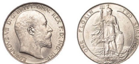
313 Florin, 1906 (ESC 3582; S 3981). Small scratch on king's cheek, otherwise about as struck