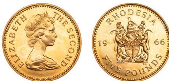
G 793 Elizabeth II , Proof 5 Pounds, 1966 (KM. 7; F 1). About as struck; in case of issue