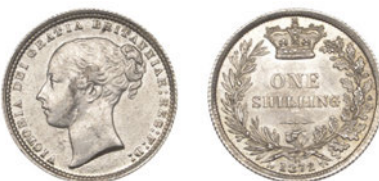
278 Shilling, 1872, die 94 (ESC 3042; S 3906A). Good extremely fine but metal flaw on queen's face