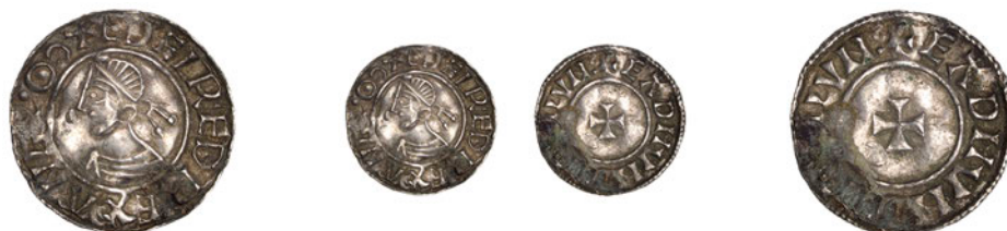
77 Penny, Last Small Cross type, London, Eadmund, EADMUND M O N LVN., late London D dies, reads ANGOR, 1.17g/6h (Lyon, BNJ 1998, p.24; SCBI Copenhagen 742; BEH 2322; N 777; S 1154). Lightly pecked and crimped with some surface deposits, otherwise very fine, grey tone £120-£150