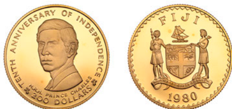
G 712 Elizabeth II, Proof 200 Dollars, 1980 (KM. 47; F 4). Brilliant, as struck; in case of issue