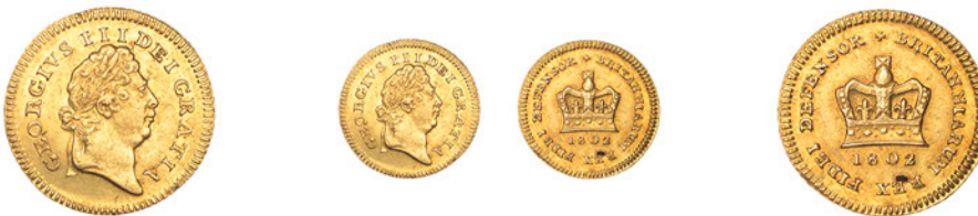
G 202 Third-Guinea, 1802, first bust (EGC 872; S 3739). Lightly cleaned, spot on reverse, otherwise about extremely fine £300-£400