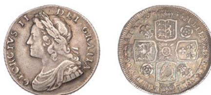
182 Shilling, 1736, roses and plumes (ESC 1709; S 3700). About very fine, toned