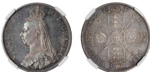
259 Proof Florin, 1887, Jubilee head (ESC 2954; S 3925). Lightly hairlined, good extremely fine, dark tone [slabbed NGC PF 62 Cameo] £300-£400