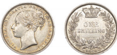
271 Shilling, 1868, die 21 (ESC 3036; S 3906A). About extremely fine