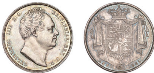
x 238 Halfcrown, 1836 (ESC 2482; S 3834). Toned, about extremely fine