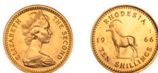
G 795 Elizabeth II , Proof 10 Shillings, 1966 (KM. 5; F 3). Adhesion in centre of obverse, otherwise about as struck; in case of issue