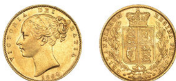
G 243 Sovereign, 1864, die 69 (M 49; S 3853). About extremely fine