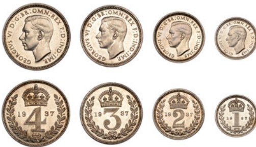
319 Maundy set, 1937 (ESC 4304; S 4086) [4]. About as struck