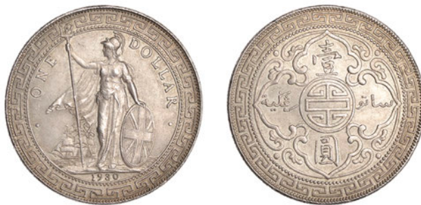
689 Trade Dollar, 1930 B (Prid. 27; KM. T5). About extremely fine