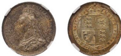
283 Shilling, 1887, Jubilee head (ESC 3137; S 3926). Good extremely fine, mottled toning [slabbed NGC MS 63]