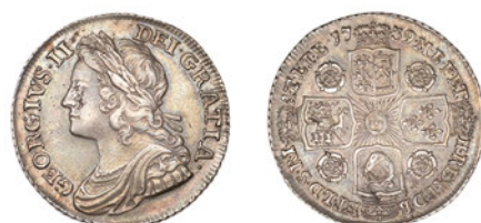
183 Shilling, 1739, roses, larger lettering on obv. (ESC 1716; S 3701). Flan flaw on king's face, otherwise about extremely fine, attractively toned