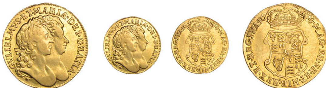
162 Guinea, 1694 (EGC 375; S 3426). Traces of mounting on edge, otherwise very fine

Provenance: Bt Spink & Son; consigned by a descendant of President F.W. de Klerk of the Republic of South Africa