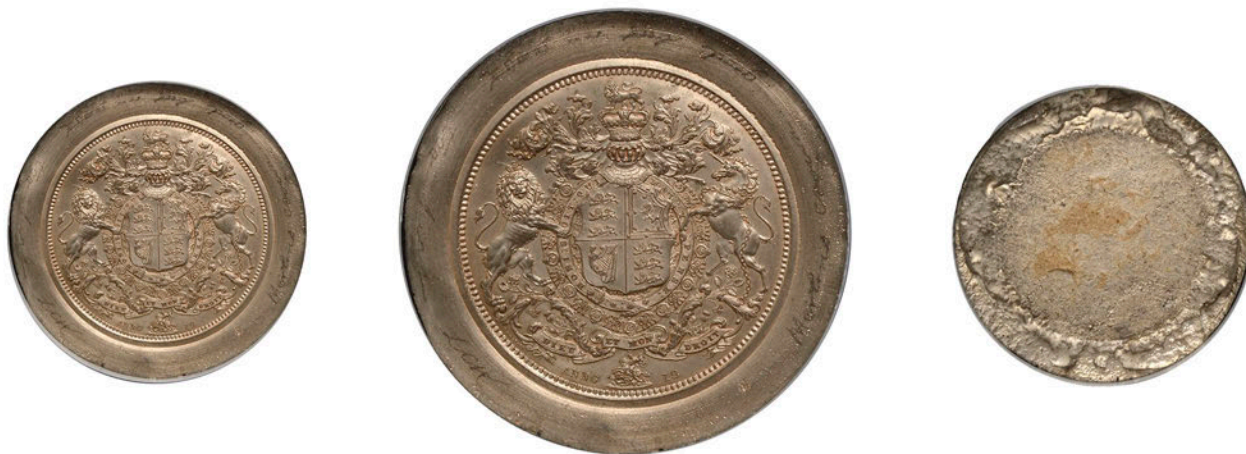
236 Crown, uniface pattern or die trial in lead, by J.B. Merlen, small ornate shield within collar and garter, flanked by royal supporters, date half-erased, reading ANNO 18, wide border bearing the note 'Merlin's Crown good, but too good, too high L.C.W' in Wyon's hand (L & S 13, this coin ; ESC 2470, this coin ). As made, interesting and unique [slabbed NGC MS 64] Provenance: H.M. Lingford Collection, Part I, Glendining Auction, 24-26 October 1950, lot 542