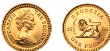
G 794 Elizabeth II , Proof Pound, 1966 (KM. 6; F 2). About as struck; in case of issue