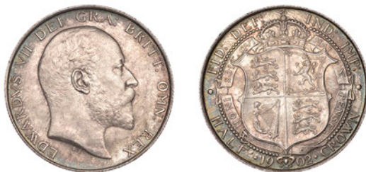
311 Halfcrown, 1902 (ESC 3567; S 3980). Extremely fine and toned