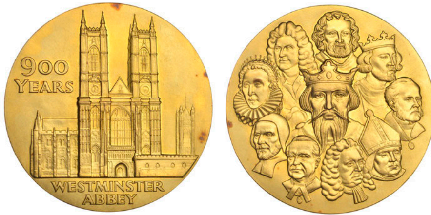
587 900th Anniversary of Westminster Abbey , 1965, a gold medal, unsigned [by M. Rizzello], view of the Abbey, rev. crowned head of Edward the Confessor facing, nine other heads of historical figures around, 57mm, 22ct, 127.96g (E 2107). About as struck; in case of issue £5,000-£7,000 No. 443 of 1000 issued in gold