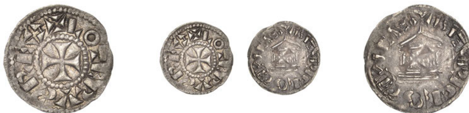
713 Lothaire (954-86), Denier, Bourges, LOTENVS REX (s retrograde), cross, rev. BITVRICES CIVITAS, temple, 1.19g/10h (MG 1672 var.). Reverse slightly double-struck, otherwise very fine