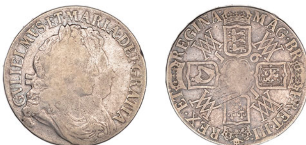
163 Crown, 1691, I of GVLIELMVS over E, edge TERTIO (ESC 821; S 3433). Fine