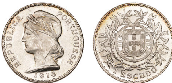
791 Republic , Escudo, 1916 (Gomes 23.02; KM. 564). About as struck [slabbed NGC MS 63]