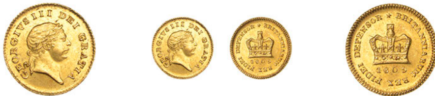
G 203 Third-Guinea, 1809, second bust (EGC 878; S 3740). About extremely fine £300-£400