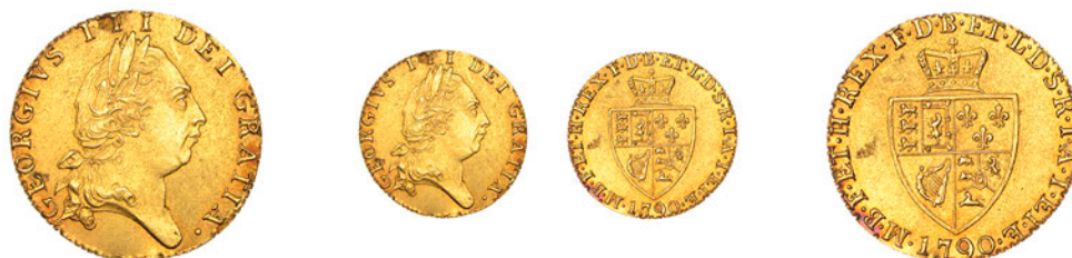
x 197 Half-Guinea, 1790, fifth bust (EGC 833; S 3735). Removed from a mount, has been gilt, otherwise about extremely fine £200-£260