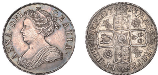
x 174 Crown, 1713, roses and plumes, edge DVODECIMO (ESC 1349; S 3603). Lightly cleaned at one time and now re-toned, minor flecking on reverse, otherwise about extremely fine £1,500-£1,800