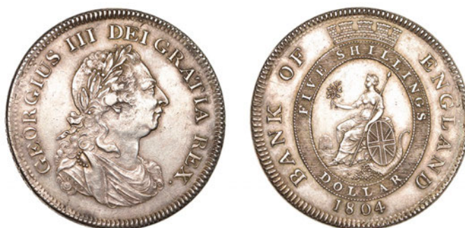
212 Dollar, 1804, types C/2b, leaf to centre of E in DEI, incuse inverted κ on rev. (ESC 1941; S 3768). Cleaned, some light scratches, otherwise good very fine, scarce; traces of undertype visible £240-£300