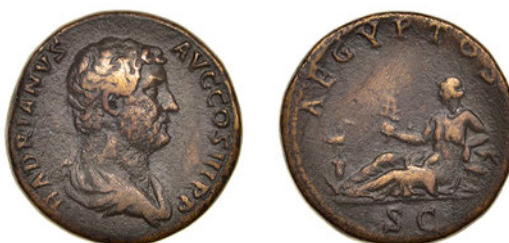
990 Hadrian , Sestertius, c. 130-3, bare-headed draped bust right, rev. Ægyptos reclining left holding up sistrum, ibis on column in front, 24.86g (RIC 1595; BMCRE 1692; RCV 3572). Good fine, brassy highlights £150-£200