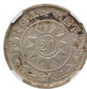
703 REPUBLIC, Fukien, 20 Cents, yr 17 [1928] (L & M 850; KM. Y389.1). Lightly cleaned, otherwise about extremely fine [slabbed NGC AU Details, Cleaned] £100-£120