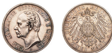
733 SAXE-WEIMAR-EISENACH, Carl Alexander, 2 Marks, 1892 A (KM. Y168.1). Cleaned, otherwise extremely fine £150-£200