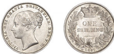
267 Shilling, 1867, die 3 (ESC 3030; S 3905). Extremely fine or better