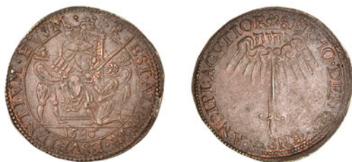
539 Assistance Given to the United Provinces , 1586, a copper jeton, unsigned, Elizabeth I enthroned facing, rev. sword beneath celestial cloud, 31mm (MI I, 133/87; E 52). Double-struck, otherwise good very fine £100-£120