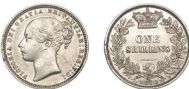
276 Shilling, 1870, die 12 (ESC 3038; S 3906A). Nearly extremely fine, a few dark spots