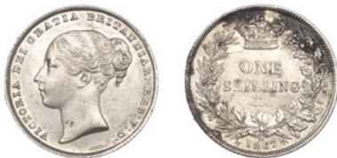
269 Shilling, 1867, die 13 (ESC 3030; S 3905). Extremely fine, some dark deposit