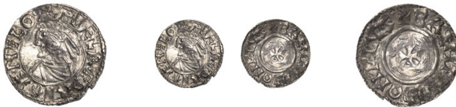
78 Penny, Last Small Cross type, Winchester, Brihtnoth, BREHTNOD ON PINCS, Winchester A dies, reads ANGLŌ; 1.10g/6h (Lyon, BNJ 1998, p.22; Winchester Mint 732; BEH 4115; N 777; S 1154). Creased, minor surface cracks around legends, good fine £90-£120