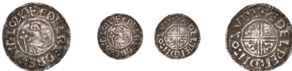
73 Penny, CRVX type, Æthelweard, Southwark, ÆDELPERD M-O SVD, 1.48g/9h (BEH 3583; N 770; S 1148). Slight curve to flan and lightly pecked, otherwise good fine £90-£120