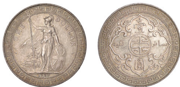
688 Trade Dollar, 1929 B (Prid. 26; KM. T5). About extremely fine