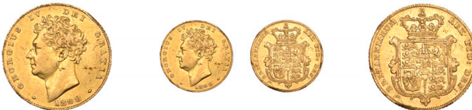
G 226 Half-Sovereign, 1828 (M 409; S 3804). Edge knocks and scuffs, about very fine £200-£260