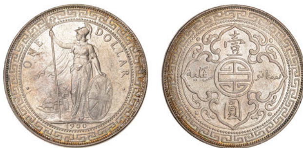
685 Trade Dollar, 1900 B (Prid. 9; KM. T5). Some contact marks, otherwise about extremely fine