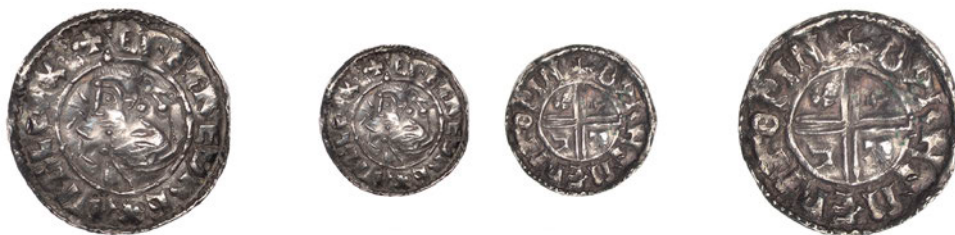
74 Penny, Intermediate Small Cross / CRVX type mule, Winchester, Beorhtmær, BYRHTMÆR M' O PIN, diademed bust left, no sceptre, 1.64g/6h (Winchester Mint 543; SCBI Copenhagen 1368; SCBI Mack 910; BEH 4158; N 773/770; S 1150/1148). Peckmarked and crimped, otherwise about very fine, very rare £400-£500