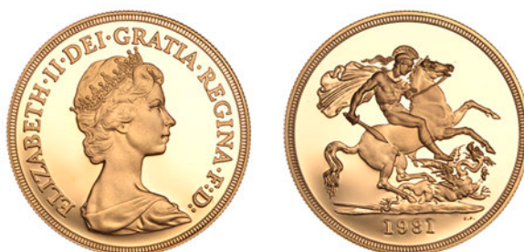
G 322 Proof Five Pounds, 1981 (Hill F45; S SE1). Brilliant, as struck; in case of issue