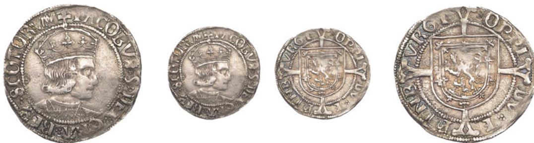
355 Second coinage, Groat, type III, Edinburgh, tiny trefoil on inner circle behind head, trefoil stops, reads SCOTORVM and OPPIDV , 2.66g/8h (Stevenson III; SCBI 35, 933; SCBI 58, 60ff; B 14, fig. 716; S 5378). Very fine or better with a good portrait £600-£800