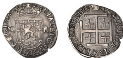
357 First period, Testoon, type IIIa, 1558, mm. crown on rev. only, low-arched crown, no annulets below, 5.84g/4h (SCBI 35, 1016ff; SCBI 58, 356ff; B 20ff, fig 795ff; S 5406). About very fine, toned £300-£400