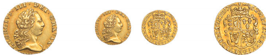
x 205 Quarter-Guinea, 1762 (EGC 886; S 3741). Brushed, a few light scratches, otherwise good very fine, toned £400-£500