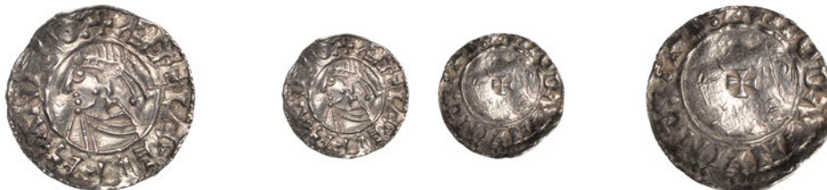
79 Penny, Last Small Cross type, Winchester, Sigeboda, SIBODA ON PINCSTRE, Winchester dies, reads ANGLŌ, trace of v in reverse field, 1.47g/9h (Lyon, BNJ 1998, pp.22-3; Winchester Mint 896; BEH 4309; N 777; S 1154). Creased and pecked, very fine, reverse about so £90-£120