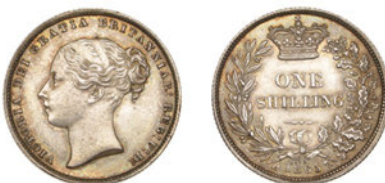
263 Shilling, 1865, die 59 (ESC 3025; S 3905). Toned, about extremely fine £80-£100