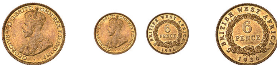
691 George V, Specimen Sixpence, 1936 KN , edge grained, 2.85g/12h (Vice 107; KM. 11b). Faint scratch on king's face, otherwise about as struck