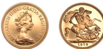
G 328 Proof Sovereign, 1979 (M 310A; S SC1). Brilliant, as struck; in case of issue