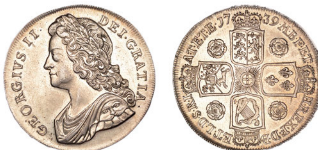
180 Crown, 1739, roses, edge DVODECIMO (ESC 1665; S 3687). Lightly cleaned, otherwise about extremely fine