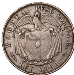
706 Nueva Granada, Pattern 16 Pesos, 1847, in copper, Bogota, edge inscribed DIOS LEI LIBERTAD, 13.84g/12h (KM. Pn6). About very fine, rare