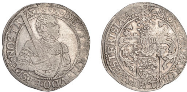
765 WEST FRIESLAND , Rijksdaalder, 1593, 28.37g/10h (Delm. 924; Dav. 8865). Lightly cleaned, otherwise about very fine £100-£120