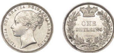
279 Shilling, 1873, die 3 (ESC 3043; S 3906A). Extremely fine or better