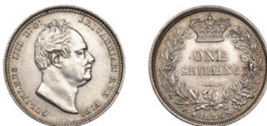
239 Shilling, 1836 (ESC 2494; S 3835). About extremely fine, obverse lightly cleaned, reverse toned