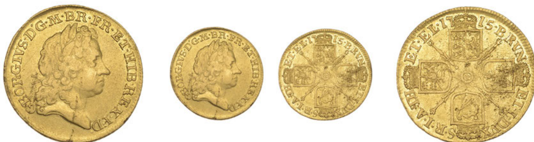
177 Guinea, 1715, third bust (EGC 503; S 3630). Light scratch behind head, otherwise good very fine, some residual lustre in legends £2,200-£2,600