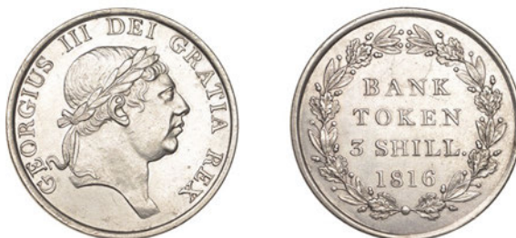
214 Three Shillings, 1816 (ESC 2085; S 3770). Lightly cleaned, otherwise about extremely fine, very rare £800-£1,000 Provenance: DNW Auction 75, 26 September 2007, lot 474; P. Pywell-Phillips Collection, Spink Auction 257, 30-31 October 2018, lot 441