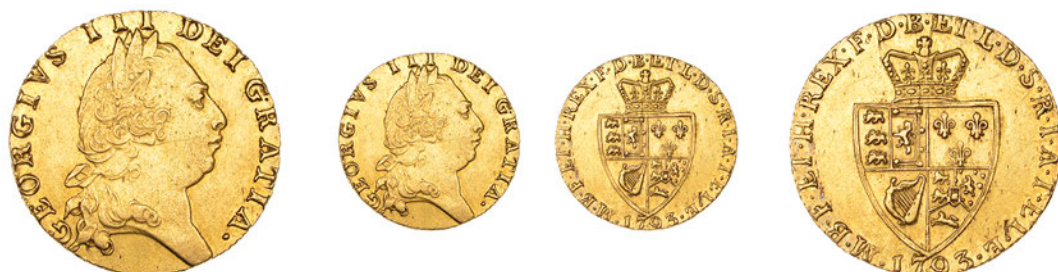
x 194 Guinea, 1793, fifth bust (EGC 723; S 3729). Cleaned, otherwise good very fine