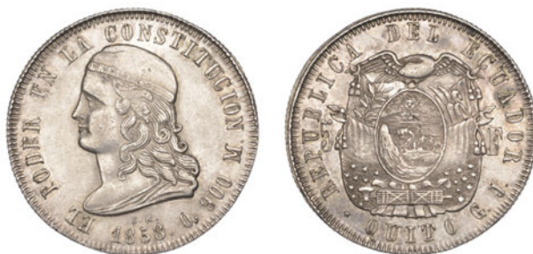
710 Republic, 5 Francos, 1858G, Quito, 25.13g/6h (KM. 39). Extremely fine [slabbed NGC MS 63]