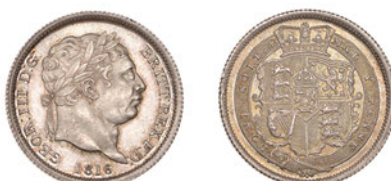
217 Shilling, 1816 (ESC 2140; S 3790). Toned, good extremely fine £100-£120