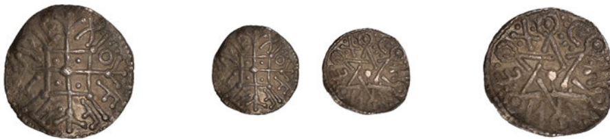
67 Offa , Penny, Light coinage, East Anglian mint (Ipswich?), Ecghun or Egann, XOFFA+RE in angles of floriate long cross dividing central square with pellet in each quarter, rev. EXCHVN in angles of six-pointed star with rosette ends, 1.04g/4h (Chick 168-70, same rev. type; Naismith & Naylor –; SCBI BM 41, same rev. type; N 334; S 907). Small bend to flan, minor scuff on reverse, otherwise of sound fabric, very fine, grey find patina, extremely rare £2,000-£2,600