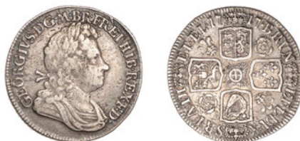
179 Shilling, 1717, roses and plumes (ESC 1564; S 3645). About very fine