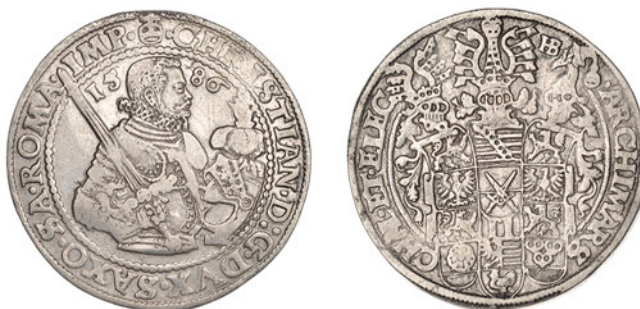
735 SAXONY, Christian I , Thaler, 1586 HB , Dresden, 28.99g/3h (Schnee 731; Dav. 9806). Lightly cleaned, otherwise very fine £200-£260