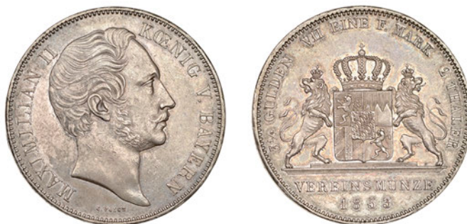
724 BAVARIA, Maximilian II, Double Thaler, 1853 (Dav. 601; KM. 837). Cleaned at one time and now re-toned, otherwise good very fine £200-£240