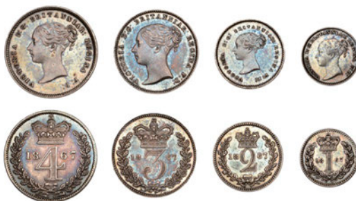
294 Maundy set, 1867 (ESC 3516; S 3916) [4]. Extremely fine with matching tone; in case of issue