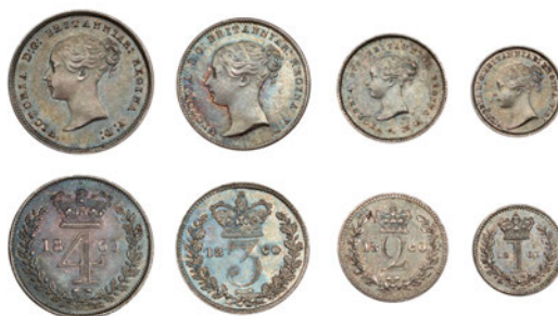
293 Maundy set, 1860 (ESC 3506; S 3916) [4]. Extremely fine with matching tone