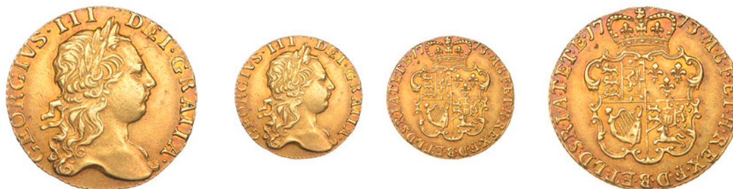
x 189 Guinea, 1773, third bust (EGC 684; S 3727). Very fine, attractively toned