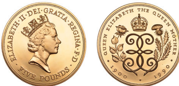
G 325 Proof Five Pounds, 1990, struck in gold (S L1; F 436). Brilliant, as struck; in case of issue