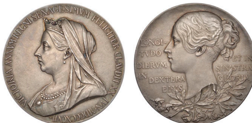
574 Victoria, Diamond Jubilee, 1897 , a silver medal by G.W. de Saulles, similar, 55mm, 84.50g (W & E 3000A.4; BHM 3506; E 1817a). A few light marks, otherwise extremely fine; in case of issue £100-£120