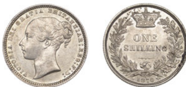
273 Shilling, 1870, die 7 (ESC 3038; S 3906A). Extremely fine or better