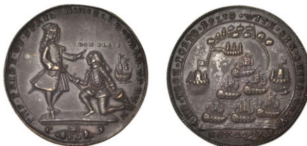
544 Capture of Portobello , 1739, a pinchbeck medal, unsigned, de Lezo kneeling, offering sword to standing Vernon, small ship to right, rev. Portobello harbour, one ship inside and five outside, 38mm (Adams PBvI 2-B; Betts 307; MI -). Good very fine £200-£260