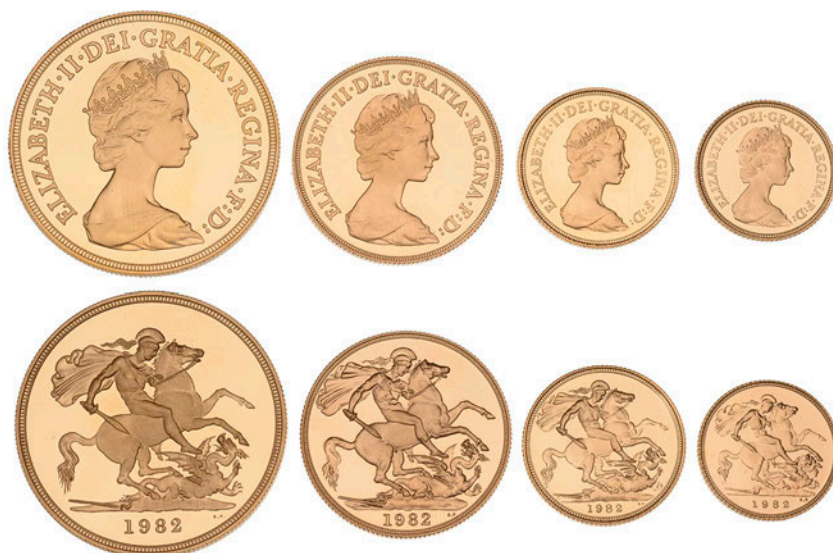
G 343 Proof set, 1982, comprising gold Five Pounds, Two Pounds, Sovereign and Half-Sovereign [4]. Brilliant, as struck; in case of issue £3,000-£4,000