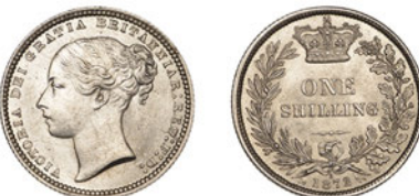
277 Shilling, 1872, die 2 (ESC 3042; S 3906A). Good extremely fine