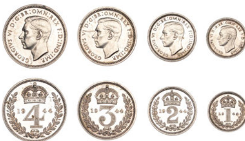
321 Maundy set, 1944 (ESC 4313; S 4086) [4]. Light scrapes on obverses of Fourpence and Threepence, otherwise about as struck; in case of issue