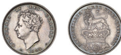
x 230 Shilling, 1825, type 3 (ESC 2405; S 3812). Light scratch in obverse field, otherwise extremely fine, toned £100-£120