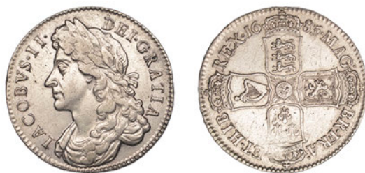
159 Halfcrown, 1685, first bust, edge PRIMO (ESC 748; S 3408). Lightly cleaned, otherwise very fine