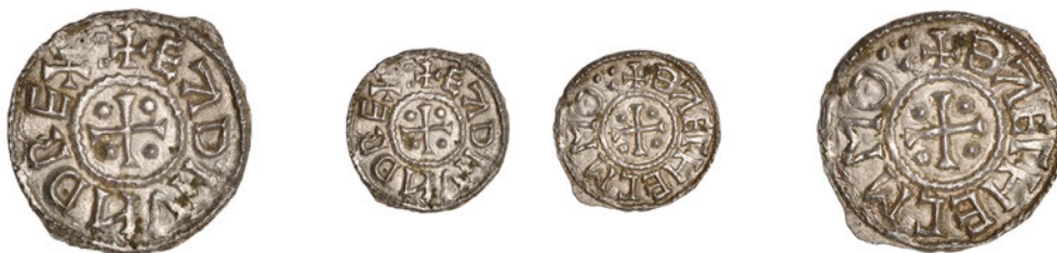
69 Eadmund (855-69), Penny, Bæghelm, EADMVND REX , cross pattée with pellets in angles, rev. BAEFHELM MO: , cross pattée with pellets in angles, 1.22g/3h (Naismith 61; SCBI East Anglia 1072; SCBI BM 947-52; N 456; S 955). About extremely fine and extremely rare thus £2,000-£2,600