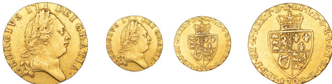
x 192 Guinea, 1790, fifth bust (EGC 718; S 3729). About very fine