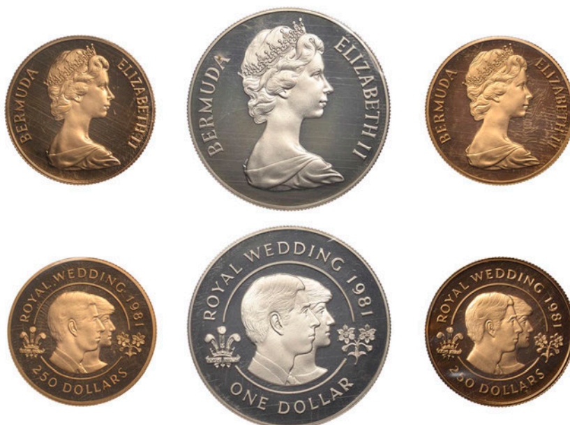
674 Elizabeth II , Proof set, 1981, comprising gold 250 Dollars (2) and silver Dollar (KM. PS5) [3]. Brilliant, as struck; in case of issue £1,200-£1,500 No. 227 of 500 sets issued