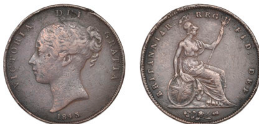
298 Penny, 1843, no colon after REG (BMC 1485; S 3948). Some marks and edge knocks, otherwise good fine, very rare