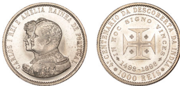
788 Carlos I , 1000 Réis, 1898 (Dav. 266; KM. 539). About as struck