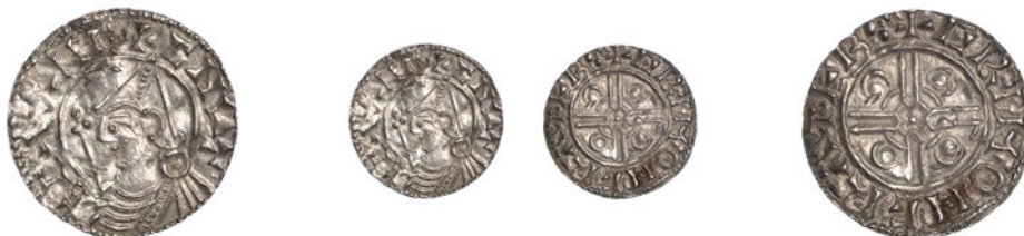
82 Penny, Pointed Helmet type, Cambridge, Grim, GRIM ON GRATEB', 0.93g/6h (BEH -; BMC 231; EMC 105.0237, same rev. die; N 787; S 1158). Peckmarked and lightly crimped, otherwise very fine; a scarcer moneyer for the mint £150-£180