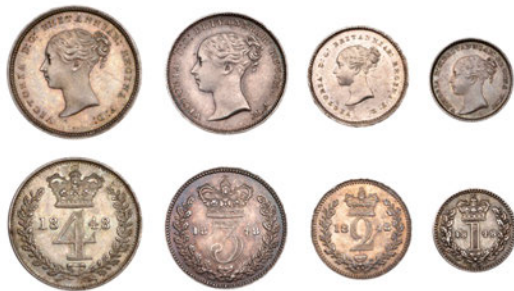
291 Maundy set, 1848 (ESC 3491; S 3916) [4]. Twopenny brushed, otherwise extremely fine