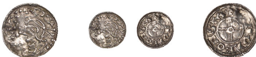
84 Penny, Short Cross type, Stamford, Morwulf, MORVLF ON STA, 0.93g/2h (SCBI Lincolnshire 1327, same rev. die; BEH 331; N 790; S 1159). Cracked through centre, good fine £90-£120