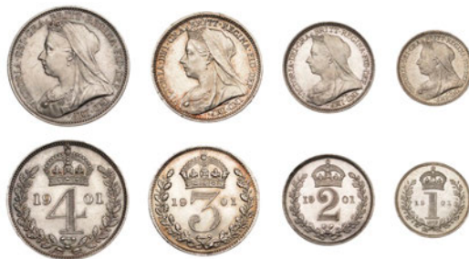
296 Maundy set, 1901 (ESC 3559; S 3943) [4]. Virtually as struck