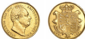
G 234 Sovereign, 1831, first bust (M 16; S 3829). Rim damage on reverse, probably due to mounting, cleaned, some marks and scratches on obverse, otherwise good very fine, rare