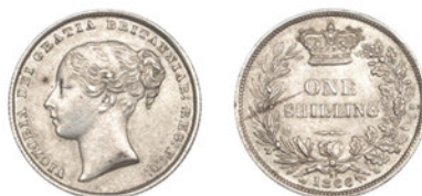
264 Shilling, 1866, die 27 (ESC 3027; S 3905). Nearly extremely fine, small discoloured patches £100-£120