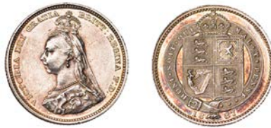
396 Proof Shilling, 1887, Jubilee head, 5.65g/12h (ESC 3138; S 3926). Obverse wiped, a few minor marks, otherwise good extremely fine