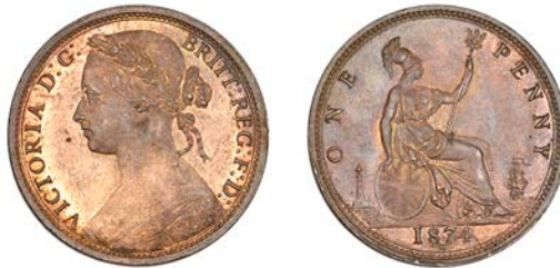
412 Penny, 1874 H , dies Kj (F 73; BMC 1697; S 3955). Good extremely fine with some original colour