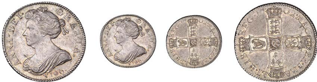
301 Shilling, 1702 VIGO (ESC 1387; S 3585). About extremely fine, toned