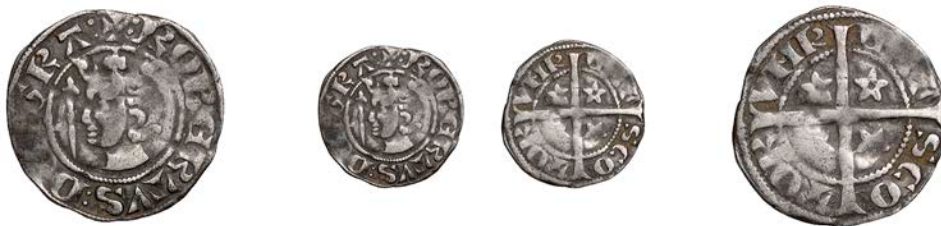
653 Sterling, colon stops, 1.28g/5h (SCBI 35, 318-20; B 1, fig. 225; S 5076). Good fine