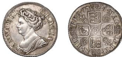
303 Shilling, 1714/3, roses and plumes (ESC 1413; S 3617). Lightly cleaned, otherwise good very fine, rare