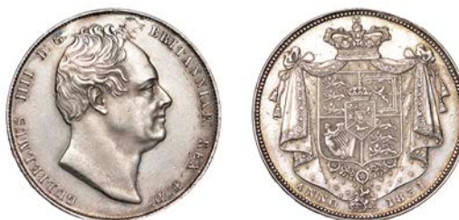
364 Proof Halfcrown, 1831, edge plain, 13.68g/6h (ESC 2473; S 3834A). Tooled in field above head and wiped, otherwise extremely fine, scarce £700-£900