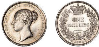
395 Shilling, 1838 (ESC 2973; S 3902). Lightly cleaned, otherwise extremely fine