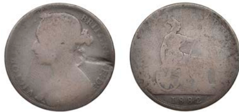
413 Penny, 1882, dies Pr (Gouby A; F 112; BMC -; S 3954). Poor, extremely rare

Provenance: Royal Berkshire Collection [from Spink 1992]