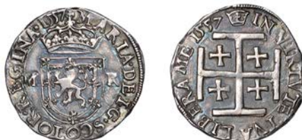
656 First period, Testoon, 1557, type IIIb, 6.05g/9h (SCBI 58, 342, same dies; S 5406). Traces of mounting on edge, otherwise good very fine, attractively toned