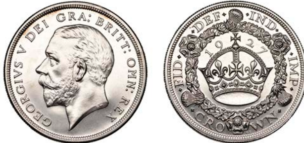
423 Proof Crown, 1927 (ESC 3631; S 4036). Brushed, otherwise about as struck