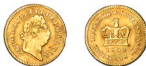
G 326 Third-Guinea, 1803, first bust (EGC 873; S 3739). Lightly cleaned, about very fine £150-£180