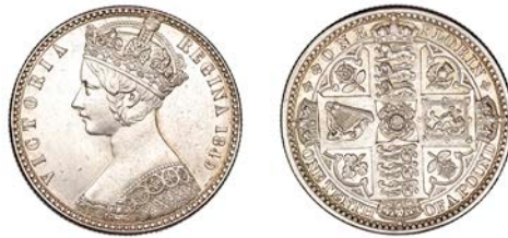
390 Florin, 1849, with initials (ESC 2815; S 3890). Of bright appearance, extremely fine or better

Provenance: Royal Berkshire Collection [from B. Reeds 2002]