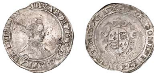
249 Second period, 6 oz issue, Shilling, MDXLIX, Tower II, mm. grapple, bust 3, no ER on rev., 4.82g/2h (N 1917/1; S 2466). Minor weakness, otherwise good very fine, rare thus £700-£900