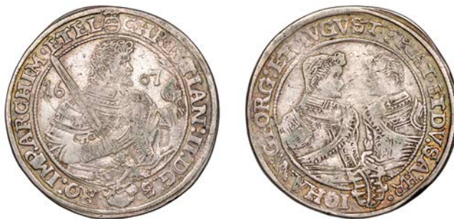
978 SAXONY, Christian II, Johann Georg and August, Thaler, 1607 HR , Dresden, 28.92g/12h (Schnee 767; Dav. 7566). Very fine £150-£180