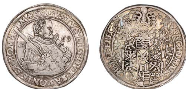
968 SAXONY, August, Thaler, 1569 HB , Dresden, 28.72g/8h (Schnee 721; Dav. 9798). Very fine £150-£180