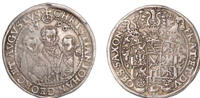
975 SAXONY, Christian II, Johann Georg and August, Thaler, 1596 HB , Dresden, 28.94g/2h (Schnee 754; Dav. 9820). Very fine £150-£180