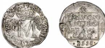
672 Second period (with Francis), Nonsunt Groat, 1558, 1.68g/2h (SCBI 35, 1101; S 5447). Minor double-striking, small scratch in centre of obverse, otherwise very fine