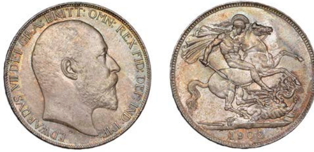
416 Crown, 1902, edge II (ESC 3560; S 3978). A few minor marks, otherwise extremely fine and toned Provenance: Sir Gerard Clauson Collection [from Seaby 1951]