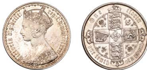
392 Florin, 1881 (ESC 2902; S 3900). Good extremely fine