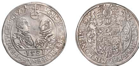
963 SAXE-COBURG-EISENACH, Johann Casimir and Johann Ernst II, Half-Thaler, 1581 B , Saalfeld, 14.34g/12h. Lightly cleaned, small scratch in centre of obverse, otherwise very fine, rare £150-£180