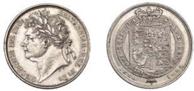
353 Shilling, 1824 (ESC 2400; S 3811). Lightly cleaned, good very fine

Provenance: Royal Berkshire Collection [from L. Bennett 1996]