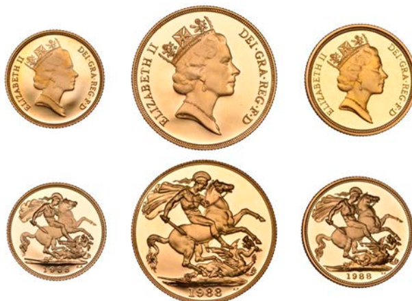
G 469 Proof set, 1988, comprising gold Two Pounds, Sovereign and Half-Sovereign (S PGS09) [3]. Brilliant, as struck; in case of issue £1,000-£1,200