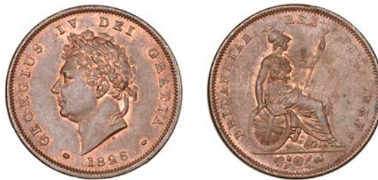
357 Penny, 1826, rev. A (BMC 1422; S 3823). Extremely fine, some original colour