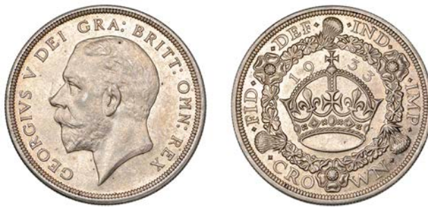
427 Crown, 1933 (ESC 3644; S 4036). A few marks, otherwise extremely fine, toned