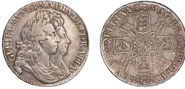
286 Crown, 1692, 2 over inverted 2, edge QUINTO (ESC 824; S 3433). Cleaned, fine