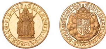
G 437 Proof Sovereign, 1989, Sovereign Anniversary (M 313H; S SC3). Minor marks in fields, otherwise brilliant, about as struck £600-£800