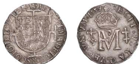
660 Second period (with Francis), Testoon, 1559, type I, 6.06g/6h (SCBI 58, 994ff; SCBI 35, 1086; S 5416). Minor double-striking, small edge split, otherwise good very fine