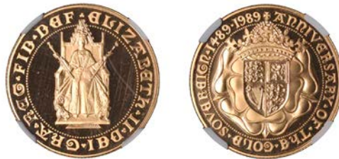
G 435 Proof Two Pounds, 1989, Sovereign Anniversary (Hill T56; S SD3). Brilliant, virtually as struck [slabbed NGC PF 66 ULTRA CAMEO]