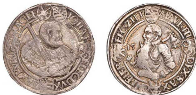
965 SAXONY, Johann Friedrich and Moritz, Thaler, 1546, Buchholz, 28.36g/11h (Schnee 117; Dav. 9736). Scratched and tooled in places, otherwise very fine £300-£400