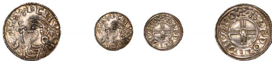
188 Penny, Short Cross type, Thetford, Ælfweald, ALFPOLD ON DEO., 1.15g/9h (Carson 99/101; BEH 3457; N 790; S 1159). Slightly crimped, otherwise very fine, light toned £200-£260