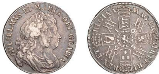
290 Halfcrown, 1693, 3 over inverted 3, edge QUINTO (ESC 857; S 3436). About very fine, toned