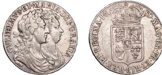
287 Halfcrown, 1689, first shield, caul and interior frosted, pearls, edge PRIMO (ESC 826; S 3434). About very fine, cleaned