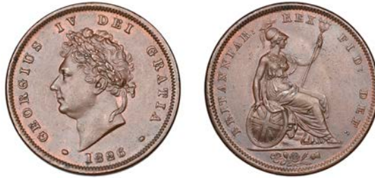
356 Penny, 1826, rev. A (BMC 1422; S 3823). Extremely fine