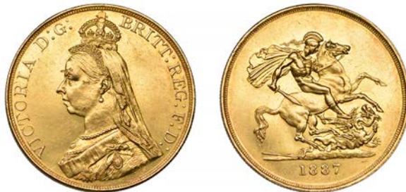
G 373 Five Pounds, 1887 (Hill F30; S 3864). Lightly brushed, minor marks on obverse, otherwise about extremely fine

Provenance: Sir Gerard Clauson Collection