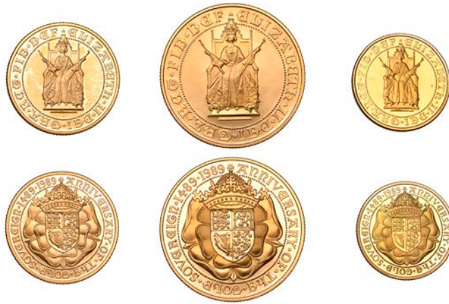
G 470 Proof set, 1989, comprising gold Two Pounds, Sovereign and Half-Sovereign, Sovereign Anniversary (S PGS11) [3]. Minor clouding on Sovereign, otherwise brilliant, as struck; in case of issue £3,000-£3,600