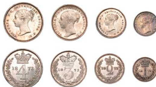
401 Maundy set, 1873 (ESC 3526; S 3916) [4]. Penny good very fine, others extremely fine or better