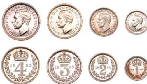
432 Maundy set, 1950 (ESC 4319; S 4096) [4]. About as struck, lightly toned; in red case of issue