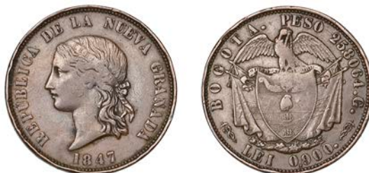
922 Nueva Granada , Pattern 16 Pesos, 1847, in copper, Bogota, edge inscribed DIOS LEI LIBERTAD, 13.84g/12h (KM Pn6). About very fine, rare