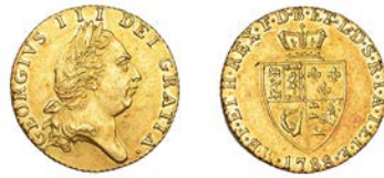
321 Half-Guinea, 1788, fifth bust (EGC 830; S 3735). Lightly brushed, otherwise about extremely fine £400-£500