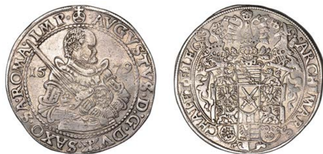
972 SAXONY, August, Thaler, 1579 HB , Dresden, 29.06g/6h (Schnee 725; Dav. 9798). Very fine £150-£180