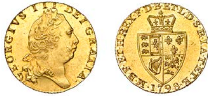
319 Guinea, 1798, fifth bust (EGC 732; S 3729). Small digs on king's cheek, lightly hairlined, otherwise good extremely fine, lustrous £600-£800