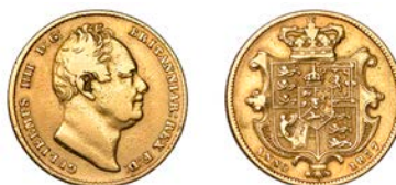
G 362 Sovereign, 1837 (M 21; S 3829B). Lightly polished, otherwise about very fine