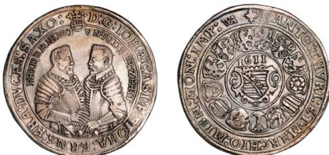
962 SAXE-COBURG-EISENACH, Johann Casimir and Johann Ernst II, Thaler, 1611 WA , Coburg, 28.95g/8h (Schnee 185; Dav. 7426). Cleaned, traces of mounting on edge, otherwise very fine £150-£180