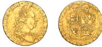
320 Half-Guinea, 1785, fourth bust (EGC 825; S 3734). Lightly brushed, some minor marks, about very fine £300-£400