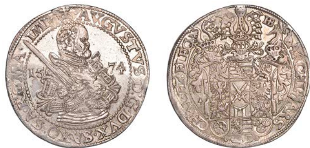
970 SAXONY, August, Thaler, 1574 HB , Dresden, 29.16g/9h (Schnee 725; Dav. 9798). Lightly cleaned, good very fine £200-£260