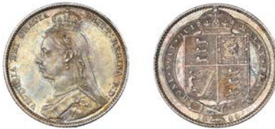
397 Shilling, 1889, large Jubilee head (ESC 3142; S 3927). Toned, extremely fine