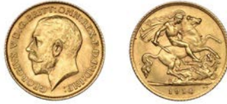
G 422 Half-Sovereign, 1914 (M 529; S 4006). About extremely fine