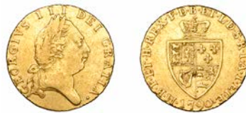
322 Half-Guinea, 1790, fifth bust (EGC 833; S 3735). Fine £200-£260