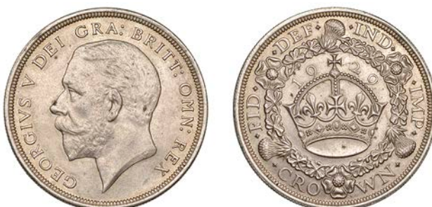
426 Crown, 1929 (ESC 3636; S 4036). About extremely fine