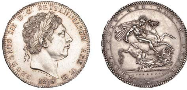
349 Crown, 1819, edge LX (ESC 2010; S 3787). Cleaned bright, extremely fine