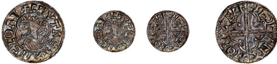
186 Penny, Quatrefoil type, Wallingford, Coleman, COLEMAN ON PELI, Winchester dies, additional pellet either side of bust, and in second and third spandrils of rev. quatrefoil, 1.05g/6h (BL p.228; SCBI Copenhagen 3934, same dies; FEJ 855, same dies; cf. BEH 3604; N 781; S 1157). A few peck marks, otherwise good very fine, rich iridescent toning, very rare £300-£360

Provenance: SCMB August 1971 (HS 2034); Royal Berkshire Collection