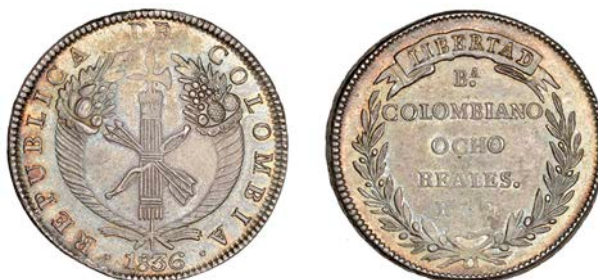
921 Republic , 8 Reales, 1836rs, Bogotá (KM 89). Extremely fine with some toning [slabbed NGC MS 63] Tied with one other example for the finest graded by NGC