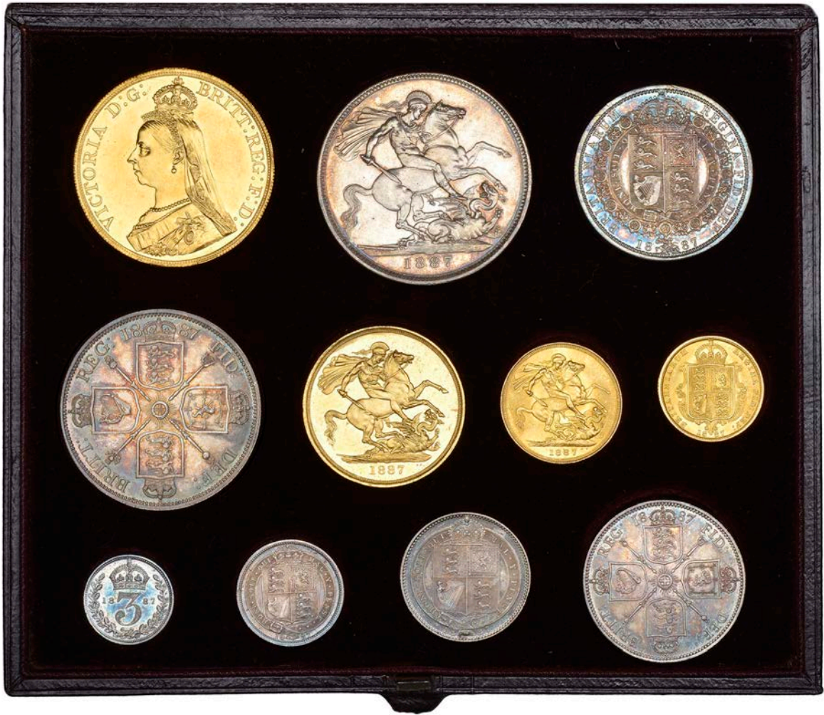
465 Specimen set, 1887, comprising Five and Two Pounds, Sovereign and Half-Sovereign, Crown to Threepence [11]. The gold extremely fine or better, the silver about extremely fine and toned; housed in fitted case £3,600-£4,000