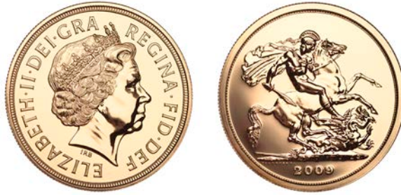
G 434 Five Pounds, 2009 (S SE11). About as struck; in case of issue with certificate of authenticity (no. 456)