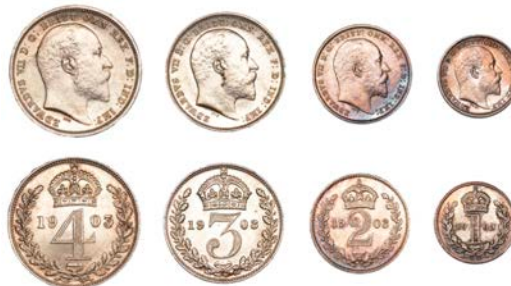
419 Maundy set, 1903 (ESC 3609; S 3985) [4]. Good extremely fine, toned; in dated leather case of issue