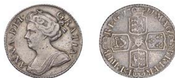
304 Sixpence, 1711, small lis in French shield (ESC 1460; S 3619). Good very fine, toned