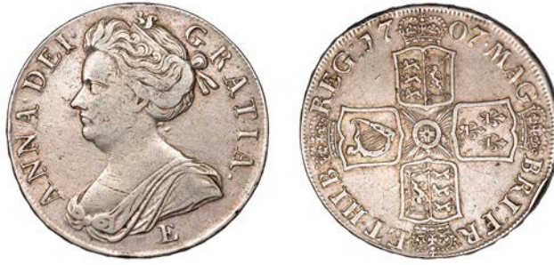
299 Crown, 1707 E , second bust, edge SEXTO (ESC 1352; S 3600). Sometime cleaned, about very fine