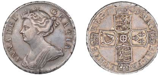
300 Halfcrown, 1709, edge OCTAVO (ESC 1371; S 3604). Adjustment marks below bust and edge bruise on reverse, otherwise very fine, toned