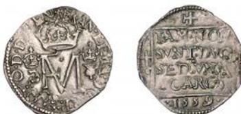
673 Second period (with Francis), Nonsunt Groat, 1559, dolphin facing left, 1.73g/12h (SCBI 35, 1106-8; S 5448). Minor double-striking, otherwise very fine