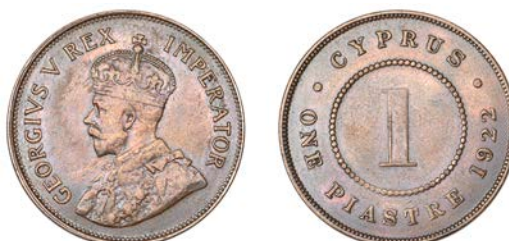
926 George V , Piastre, 1922 (Prid. 38; KM 18). Good very fine, scarce