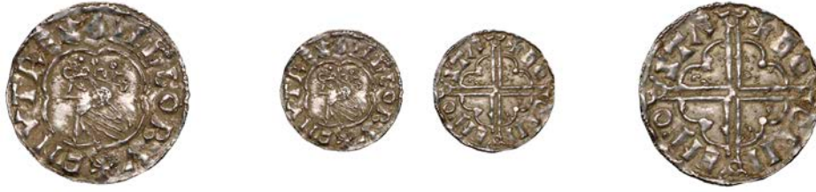
185 Penny, Quatrefoil type, Stamford, Godwine, GODPINE MO STA, Lincoln dies, 0.99g/9h (BL pp.235-6; SCBI Copenhagen 3554; BEH 3266ff; N 781; S 1157). Struck from worn, rusted, dies, otherwise very fine, light dusty patina £150-£180