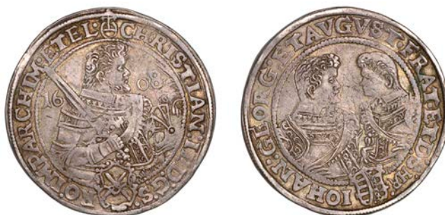
979 SAXONY, Christian II, Johann Georg and August, Thaler, 1608 HR , Dresden, 29.13g/6h (Schnee 767; Dav. 7566). Very fine £150-£180