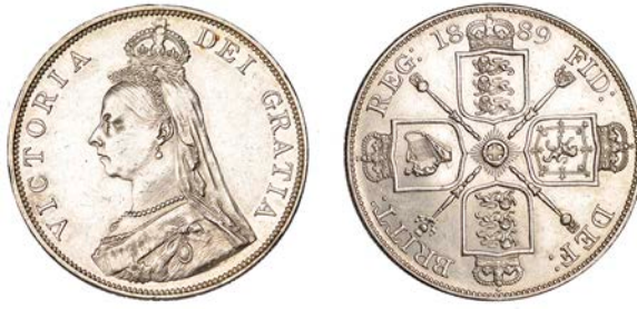
388 Double Florin, 1889 (ESC 2701; S 3923). Lightly cleaned, otherwise extremely fine