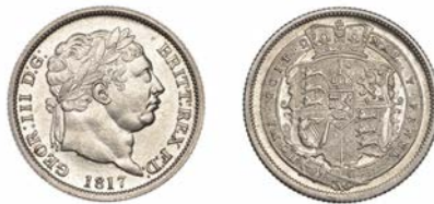
351 Shilling, 1817 (ESC 2144; S 3790). Small cut on rim at 7 o'clock on obverse, otherwise about as struck