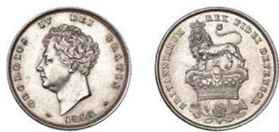
354 Shilling, 1825, type 3 (ESC 2405; S 3812). Nearly extremely fine