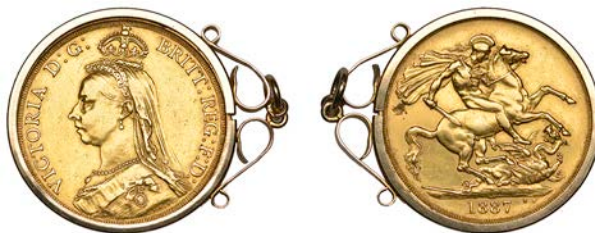
G 375 Two Pounds, 1887, large date (Hill T26; S 3865). Good very fine; set in a ring-mount