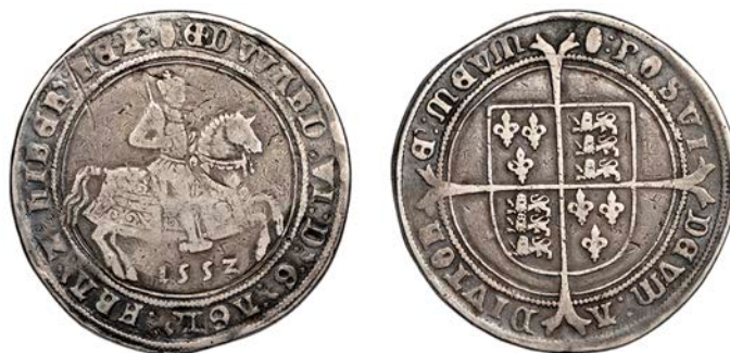
250 Third period, Fine issue, Crown, 1552, mm. tun, 30.62g/7h (N 1933; S 2478). About fine £800-£1,000