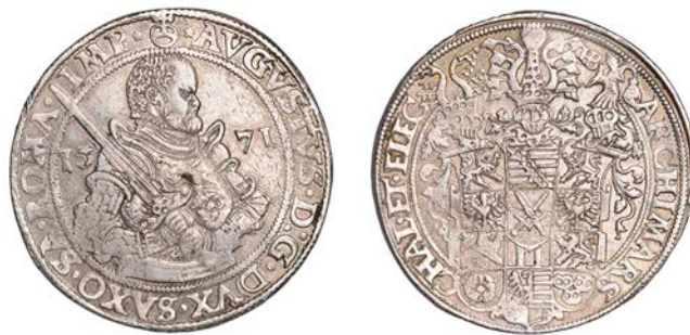
969 SAXONY, August, Thaler, 1571 HB , Dresden, 29.12g/9h (Schnee 725; Dav. 9798). Traces of mounting on edge, otherwise very fine £150-£180