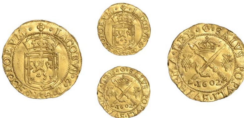
675 Eighth coinage, Sword and Sceptre piece, 1602, mm. quatrefoil, 5.09g/11h (SCBI 35, 1185ff; SCBI 58, 1307ff; B 4, fig. 956; S 5460). Good very fine