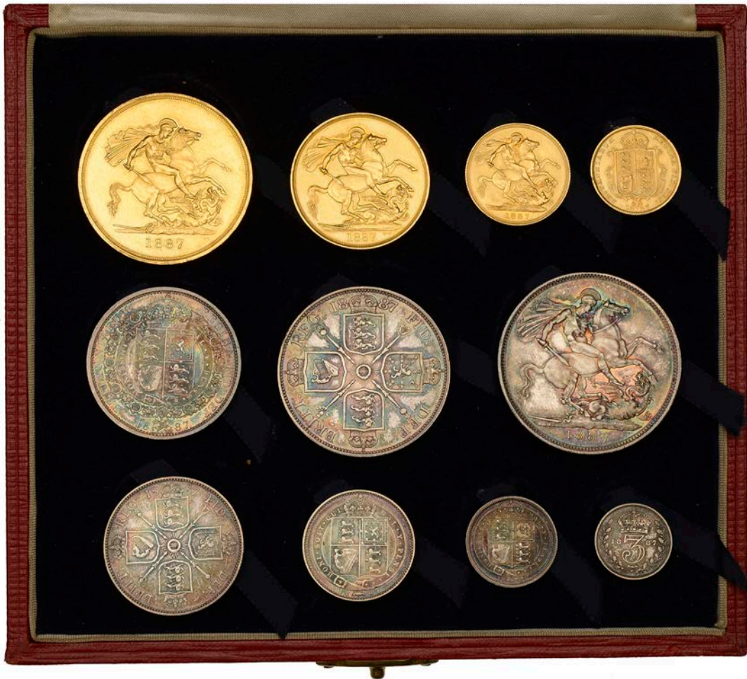
466 Specimen set, 1887, comprising Five and Two Pounds, Sovereign and Half-Sovereign, Crown to Threepence [11]. The gold extremely fine but sometime cleaned, the silver varied state; housed in fitted case £3,200-£3,600