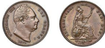
371 Farthing, 1831 (BMC 1466; S 3848). Extremely fine