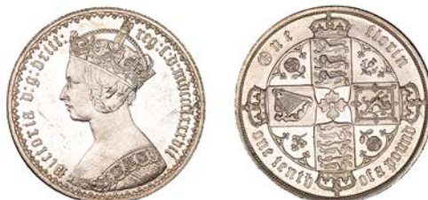
393 Florin, 1887, 46 arcs (ESC 2913; S 3901). A few light marks and hairlines, good extremely fine, bright reflective fields