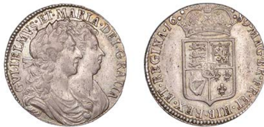
288 Halfcrown, 1689, first shield, caul only frosted, pearls, edge PRIMO (ESC 831; S 3434). Good very fine