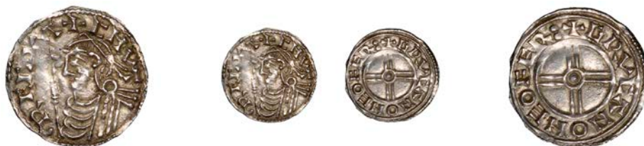
189 Penny, Short Cross type, York, Crucan, GRVCAN ON EOFER., 1.12g/3h (SCBI Copenhagen 697, same dies; BEH 635; N 790; S 1159). Very fine, lightly toned £200-£260

Provenance: Royal Berkshire Collection [from R. Gladdle 1999]