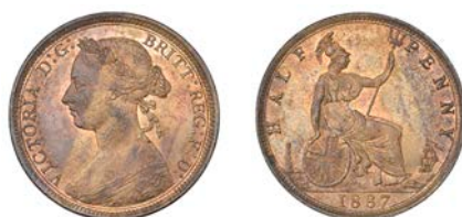
x 415 Halfpenny, 1887 (F 358; BMC 1843; S 3956). Uneven toning, otherwise lustrous extremely fine with much original colour