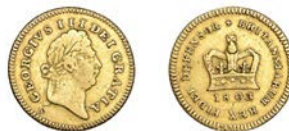
G 325 Third-Guinea, 1803, first bust (EGC 873; S 3739). Minor marks, otherwise about very fine £200-£260