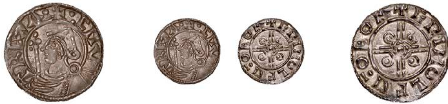
187 Penny, Pointed Helmet type, York, Grimulfr, GRIMOLF M-O EOF, 1.00g/10h (BEH 618; N 787; S 1158). Good very fine £300-£400

Provenance: SCMB August 1971 (HS 2034); Royal Berkshire Collection