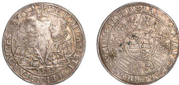
961 SAXE-COBURG-EISENACH, Johann Casimir and Johann Ernst II, Thaler, 1589 B , Saalfeld, 29.00g/7h (Schnee 174; Dav. 9758). Good very fine, the date rare £300-£400