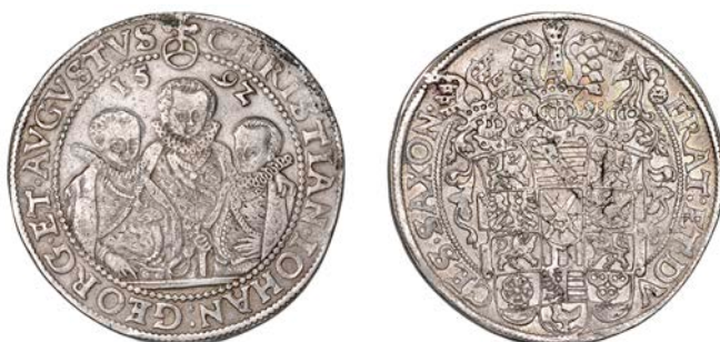
973 SAXONY, Christian II, Johann Georg and August, Thaler, 1592 HB , Dresden, 29.05g/4h (Schnee 754; Dav. 9820). Very fine £150-£180