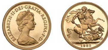
G 436 Proof Sovereign, 1982 (M 313A; S SC1). Brilliant, as struck; in case of issue