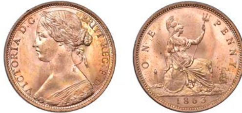
411 Penny, 1863 (F 42; BMC 1655; S 3954). Virtually as struck with full original colour