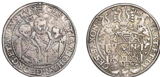
976 SAXONY, Christian II, Johann Georg and August, Thaler, 1598 HB , Dresden, 28.89g/9h (Schnee 754; Dav. 9820). About very fine £120-£150