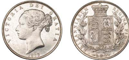
389 Halfcrown, 1883 (ESC 2762; S 3889). Of bright appearance, some minor marks, otherwise good extremely fine