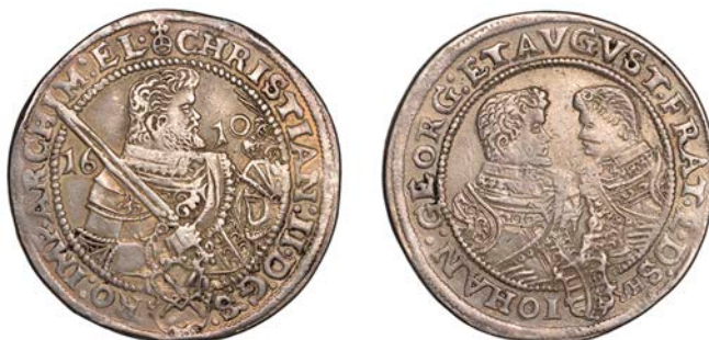
980 SAXONY, Christian II, Johann Georg and August, Thaler, 1610 HR , Dresden, 28.76g/5h (Schnee 767; Dav. 7566). Lightly cleaned, otherwise very fine £150-£180