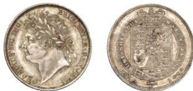
352 Shilling, 1824 (ESC 2400; S 3811). Some surface dirt, extremely fine or better