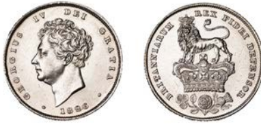
355 Shilling, 1826 (ESC 2409; S 3812). Cleaned, otherwise extremely fine