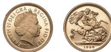
G 438 Proof Sovereign, 1998 (M 313Q; S SC4). Brilliant, as struck; in case of issue