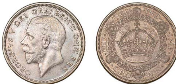
425 Crown, 1928 (ESC 3633; S 4036). Toned, nearly extremely fine