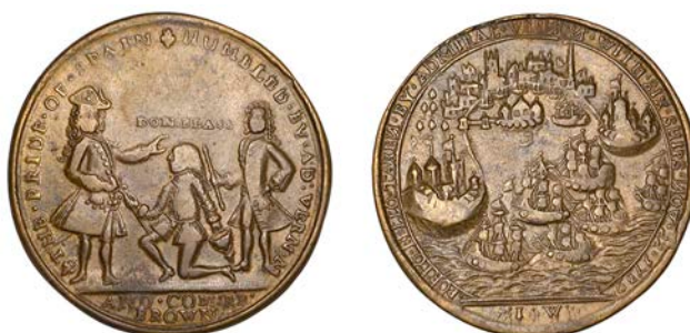
778 Capture of Portobello , 1739, a pinchbeck medal signed I.W., de Lezo kneeling, offering sword to standing Admiral Vernon, Commodore Brown standing at right, rev. six ships outside Portobello harbour, 39mm (Adams PBv1b 1-A; Betts 308; MI pl. clviii, 17). Very fine, scarce £100-£120