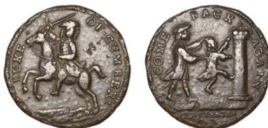
779 Rebellion Defeated , 1746, a cast copper medal, unsigned, Duke of Cumberland on horseback left, rev. Duke apprehends Princes Charles as he tries to take crown from pillar, 32mm (Woolf 56:6; MI II, 618/290). Nearly very fine £120-£150