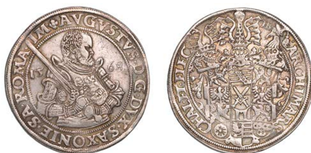
967 SAXONY, August, Thaler, 1568 HB , Dresden, 28.75g/11h (Schnee 721; Dav. 9798). Good very fine £200-£260