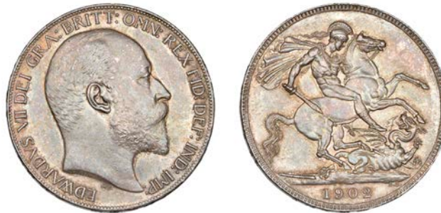
417 Crown, 1902, edge II (ESC 3560; S 3978). Nearly extremely fine, toned Provenance: Royal Berkshire Collection [from L. Bennett 1991]