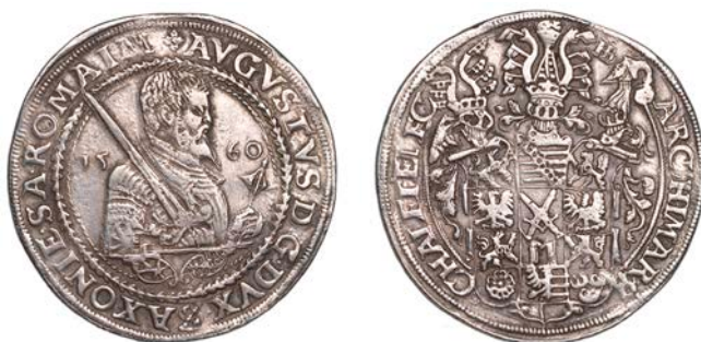
966 SAXONY, August, Thaler, 1560 HB , Dresden, 28.59g/12h (Schnee 713; Dav. 9795). Fields tooled, traces of mounting on edge, otherwise very fine £150-£180