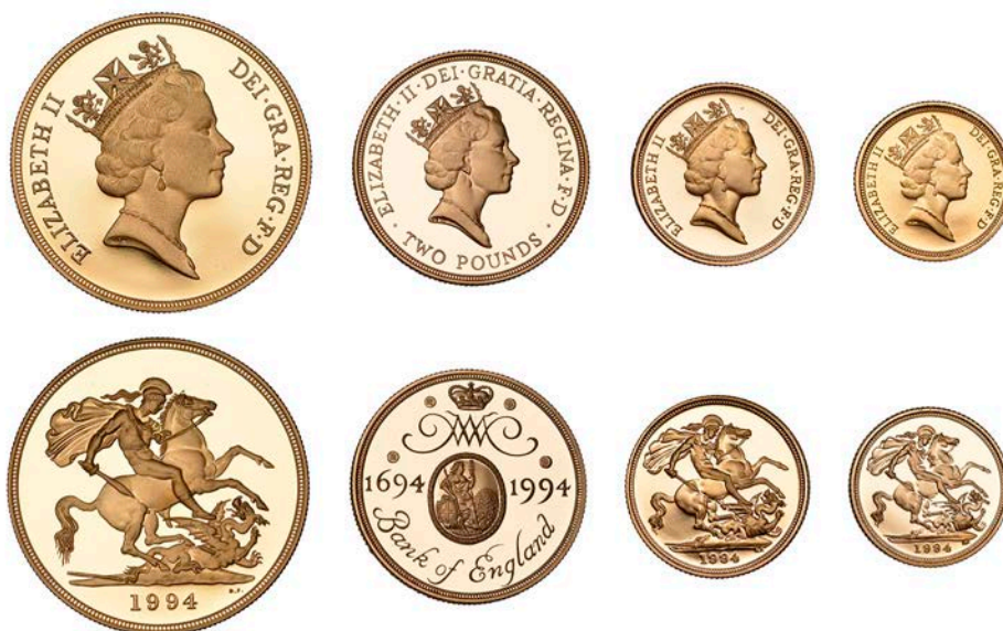
G 472 Proof set, 1994, comprising gold Five Pounds, Two Pounds, Sovereign and Half-Sovereign (S PGS20) [4]. Brilliant, as struck; in case of issue £2,400-£3,000