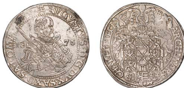
971 SAXONY, August, Thaler, 1575 HB , Dresden, 29.13g/4h (Schnee 725; Dav. 9798). Lightly cleaned, very fine £150-£180