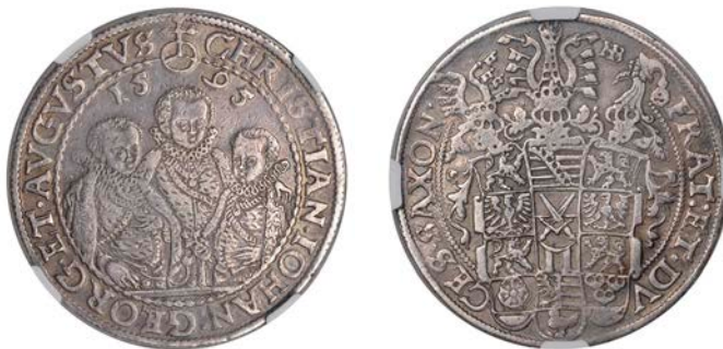
974 SAXONY, Christian II, Johann Georg and August, Thaler, 1595 HB , Dresden (Schnee 754; Dav. 9820). Very fine [slabbed NGC XF 45] £150-£180