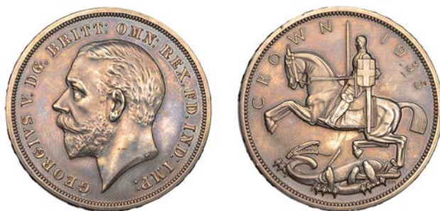
428 Proof Crown, 1935, edge raised xxv, 28.46g/12h (ESC 3655; S 4050). Lightly brushed, otherwise good extremely fine, toned