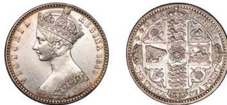
391 Florin, 1849, with initials (ESC 2815; S 3890). Cleaned, otherwise about extremely fine