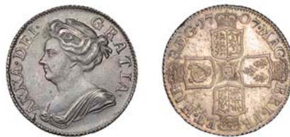
302 Shilling, 1707 (ESC 1395; S 3610). Extremely fine, dark tone on obverse