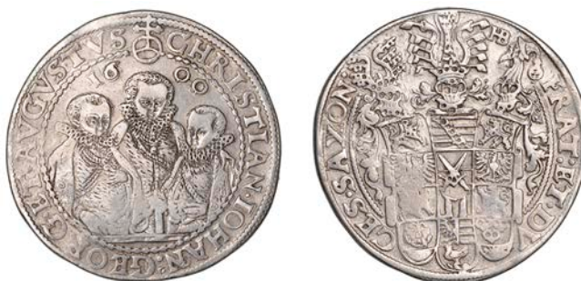
977 SAXONY, Christian II, Johann Georg and August, Thaler, 1600 HB , Dresden, 29.14g/10h (Schnee 754; Dav. 9820). About very fine £120-£150