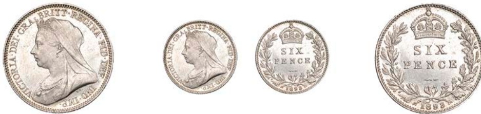
398 Proof Sixpence, 1893, edge grained, 2.84g/12h (ESC 3286; S 3941). Of bright appearance, about as struck