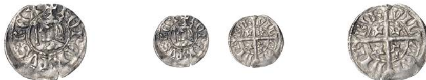
655 Halfpenny, Edinburgh, ROBERTVS REX S, rev. VILA EIDIRBVR, 0.48g/12h (SCBI 35, 504; B 4, fig. 316; S 5152). About very fine, slightly fuller and better struck than usual