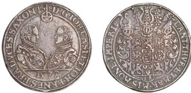
959 SAXE-COBURG-EISENACH, Johann Casimir and Johann Ernst II, Thaler, 1577, Saalfeld, 28.99g/9h (Schnee 168; Dav. 9756). Very fine £200-£260