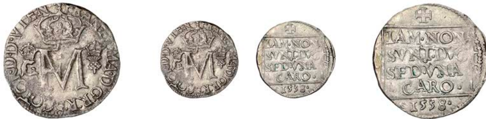
671 Second period (with Francis), Nonsunt Groat, 1558, 1.82g/2h (SCBI 35, 1101; S 5447). Very fine