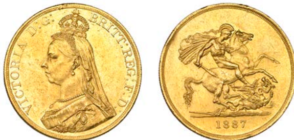
G 374 Five Pounds, 1887 (Hill F30; S 3864). Lightly cleaned, some contact marks and edge knocks, otherwise about extremely fine