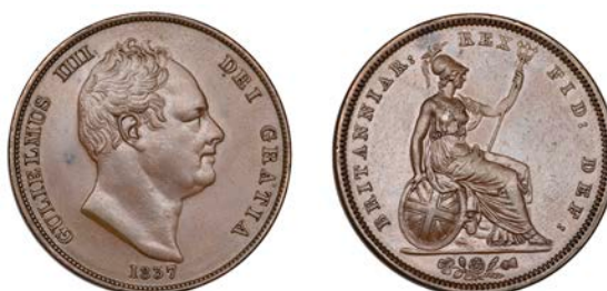
370 Penny, 1831, plain truncation (BMC 1455; S 3845). Spot behind head, otherwise about extremely fine, brown patina £300-£360