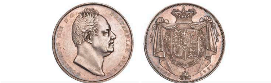
363 Proof Crown, 1831, w.w. incuse on truncation, edge plain, 27.82g/6h (L & S 1; ESC 2462; S 3833). Brushed, some contact marks, otherwise extremely fine £20,000-£24,000