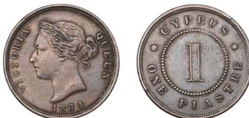
924 Victoria , Piastre, 1884 (Prid. 27; KM 3.2). Some contact marks, otherwise very fine, rare