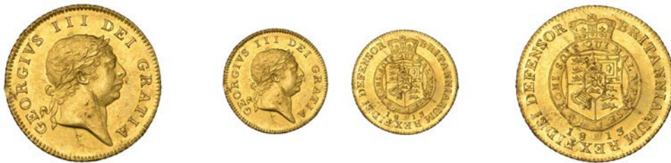
G 323 Half-Guinea, 1813, seventh bust (EGC 859; S 3737). Lightly cleaned, edge knock and other minor marks, otherwise extremely fine £600-£800