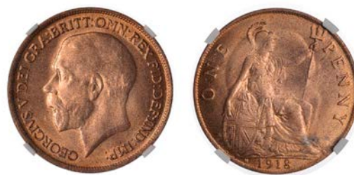
430 Penny, 1918 H (F 183; BMC 2253; S 4052). About as struck with full original colour [slabbed NGC MS 63 RD]

Provenance: Royal Berkshire Collection [from Spink 1996]