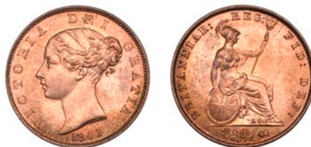
414 Halfpenny, 1841, broken E in DEI (BMC 1524; S 3949). Minor marks in reverse field, otherwise about as struck with full original colour