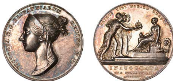
792 Victoria, Coronation , 1838, a silver medal by B. Pistrucci, diademed bust left, rev. Victoria seated left, being offered the crown by Britannia, Scotia, and Hibernia, 36mm, 19.39g (BHM 1801; E 1315). Lightly polished, otherwise good very fine; in contemporary fitted case £200-£260