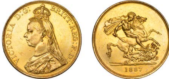
G 372 Five Pounds, 1887 (Hill F30; S 3864). Fields brushed, otherwise extremely fine