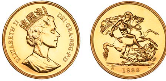
G 433 Five Pounds, 1988 (Hill F53; S SE5). Virtually as struck; in case of issue