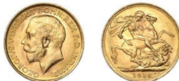
G 420 Sovereign, 1916 (M 218; S 3996). Some scuffing, otherwise extremely fine or better [slabbed NGC MS 63]