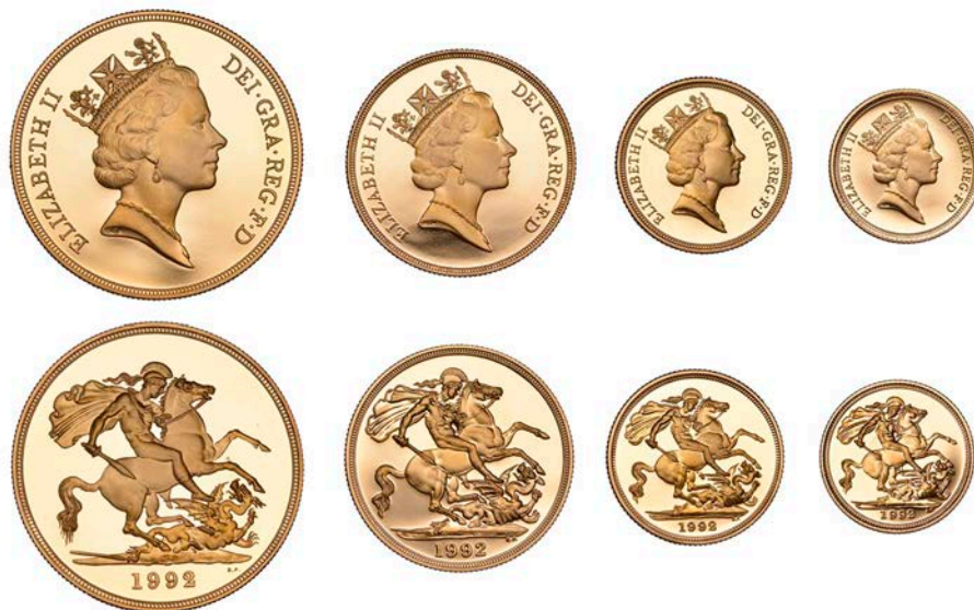
G 471 Proof set, 1992, comprising gold Five Pounds, Two Pounds, Sovereign and Half-Sovereign (S PGS16) [4]. Brilliant, as struck; in case of issue £2,400-£3,000