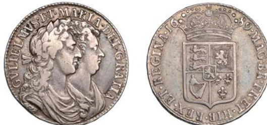
289 Halfcrown, 1689, first shield, caul only frosted, pearls, edge PRIMO (ESC 831; S 3434). Faint scratches in obverse field, nearly very fine