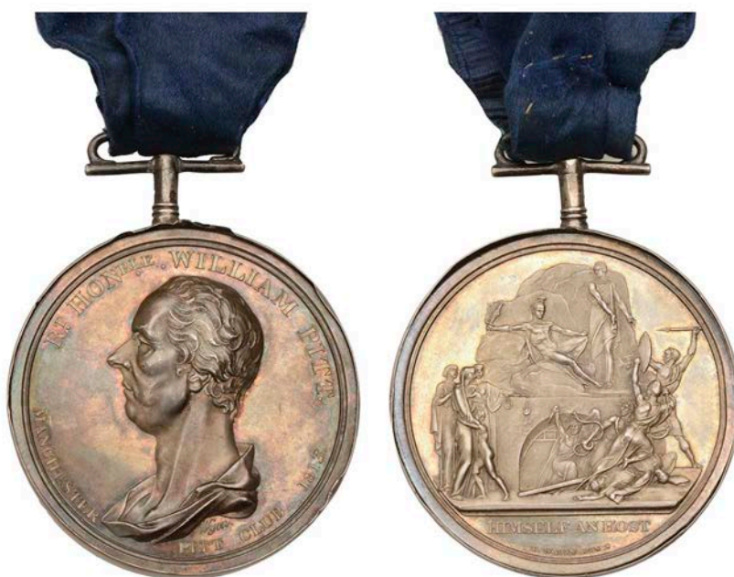
785 Manchester Pitt Club , 1813, a silver medal by T. Wyon Jr, bust left, rev. allegory of Pitt rousing Genius to resist the demons of anarchy, 50mm (BHM 771; E 1039; D & W 166/501). Good very fine and toned, unglazed, raised rim slightly damaged £100-£150