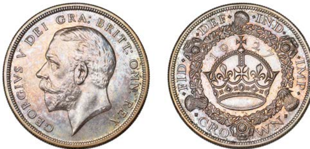
424 Proof Crown, 1927 (ESC 3631; S 4036). Toned, good extremely fine