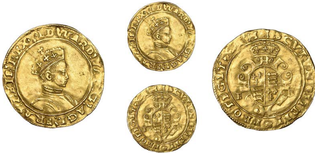
248 Second period, Half-Sovereign, Tower I, mm. arrow, crowned bust with plain breastplate, 5.28g/10h (Stewartby 2a; SCBI Schneider 672; N 1911; S 2438). Minor weakness in legends, otherwise very fine with a good portrait £3,000-£4,000