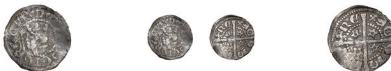
654 First coinage, First issue, Farthing, mm. cross pattée, DAV(ID) DEI GRACIA, rev. REX SCOTOR[VM], four mullets of five points, 0.28g/2h (Holmes/Stewartby, BNJ 2000, dies Cg; SCBI 35, –; B –; S 5086). Flat in one quarter, otherwise nearly very fine, very rare £500-£700