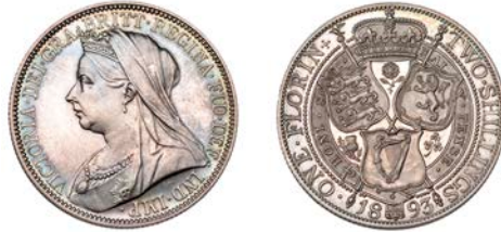
394 Proof Florin, 1893, 11.23g/12h (ESC 2963; S 3939). Fields lightly hairlined, otherwise about as struck, toned