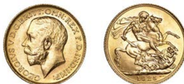
G 421 Sovereign, 1925 (M 220; S 3996). Some scuffing, otherwise extremely fine or better [slabbed NGC MS 65]