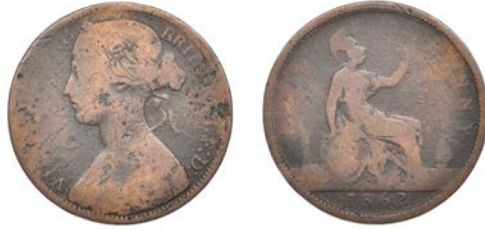
410 Penny, 1862, dies Jg, B of BRITT over R (Gouby H; F -; BMC -; S 3954). Only fair but extremely rare