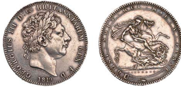
350 Crown, 1819, edge LX, no stop after TUTAMEN (ESC 2013; S 3787). Lightly cleaned, some minor marks, otherwise about extremely fine