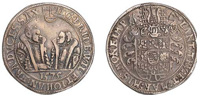
964 SAXE-OLD-WEIMAR, Friedrich Wilhelm I and Johann III, Thaler, 1575, Saalfeld, 29.09g/12h (Schnee 231; Dav. 9766). Cleaned at one time and now re-toned, otherwise very fine £200-£260