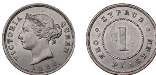
925 Victoria , Piastre, 1896 (Prid. 35; KM 3.2). Some minor marks, very fine and scarce