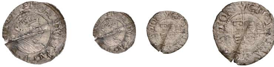
247 First period, Halfgroat, Canterbury, no mm., reads EDOARD and CANTON, 1.05g/9h (N 1901; S 2459). Creased and cracked, otherwise fine, rare £200-£260