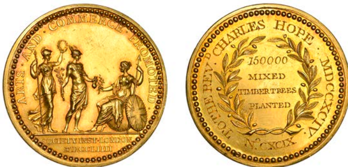
782 Royal Society of Arts (Inst. 1754), a gold award medal by T. Pingo Jr, Mercury and Minerva (representing Commerce and the Arts) standing before seated Britannia, rev. wreath, named (No. CXCIX, To The Revd Charles Hope, MDCXCIV, 150,000 Mixed Timber Trees Planted), 44mm, 43.32g (Eimer 9; MI II, 684/401; E 648). Fields brushed, otherwise extremely fine and toned, rare; in fitted case by D. George Collins Ltd, 118 Newgate Street, London £2,000-£2,600