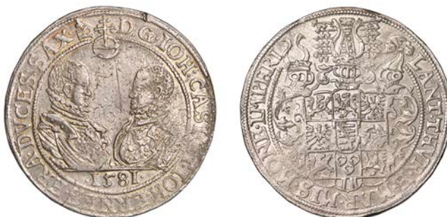
960 SAXE-COBURG-EISENACH, Johann Casimir and Johann Ernst II, Thaler, 1581 B , Saalfeld, 28.79g/1h (Schnee 170; Dav. 9756). Lightly cleaned, good very fine £200-£260