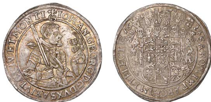
981 SAXONY, Johann Georg I, Thaler, 1624, Dresden, mm. swan, 28.98g/10h (Schnee 818; Dav. 7601). Good very fine, toned £200-£260