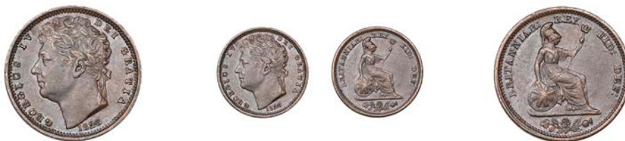
361 Half-Farthing, 1828 (BMC 1446; S 3826). About extremely fine