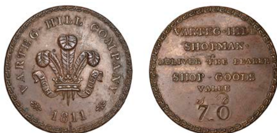
609 MONMOUTHSHIRE, Varteg , Knight & Co [Varteg Hill Ironworks], copper Seven Shillings or Third-Guinea, 1811, Prince of Wales plumes, rev. VARTEG-HILL SHOPMAN DELIVER THE BEARER SHOP GOODS above value, 34mm, 11.58g (Cox 674). About extremely fine, exceptionally rare £300-£400