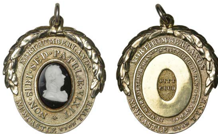
607 NORTHUMBERLAND, Newcastle-upon-Tyne , Northumberland & Newcastle-upon-Tyne Pitt Club, silver-gilt with white on black onyx cameo of Pitt in centre, rev. legend, 47 x 44mm, 25.25g (W 1974; cf. DNW 62, 1360). About extremely fine £200-£300