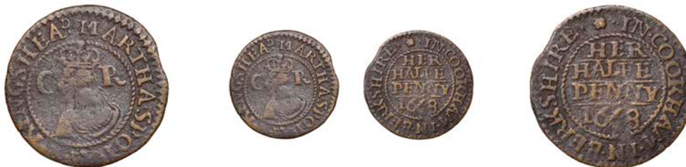
8 Cookham , Martha Spot, Halfpenny, 1668, 1.01g/12h (N 76; BW. 17). About fine; the only issue for the town £50-£70