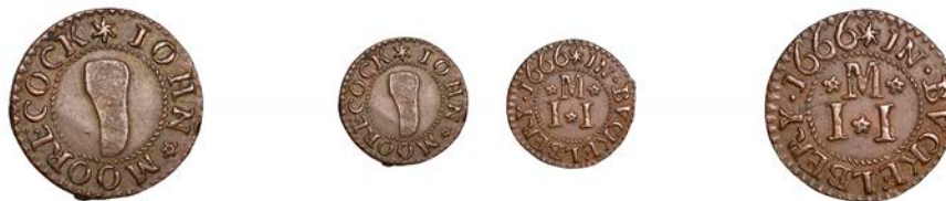
6 Bucklebury , John Moorecock, Farthing, 1666, 1.38g/3h (N 75, this piece ; BW. 16). Good very fine, rare; the only issue for the village £150-£200

Provenance: R.A. Nott Collection; Norweb Collection; SNC September 1987 (5357); Baldwin's of St James's Auction 7, 21 June 2017, lot 24