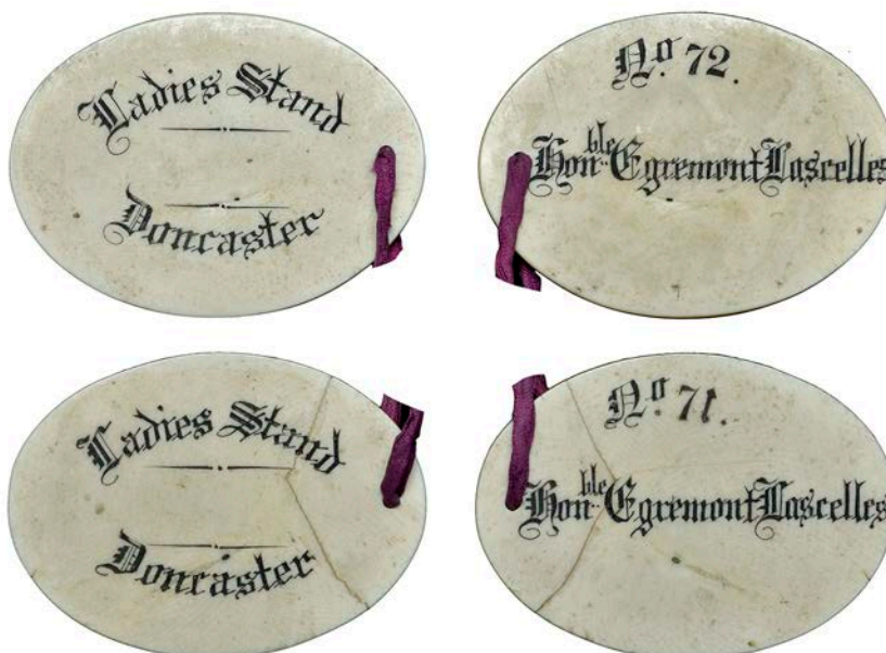
608 YORKSHIRE, Doncaster , oval bone (2), Ladies Stand, undated, backs named (No. 71, Honble. Egremont Lascelles; No. 72, Honble. Egremont Lascelles), both 50 x 37mm, 7.28g and 8.04g (W –; D & W –) [2]. Fine to very fine but No. 71 cracked and repaired, very rare; both pierced for suspension £400-£600

Provenance: DNW Auction 176, 26 May 2020, lot 288