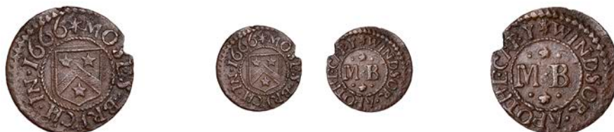
57 Windsor , Moses Bruch, Farthing, 1666, 0.92g/12h (N 248; BW. 165); Will Campion, Halfpenny, 1669, 1.17g/6h (N 258; BW. 167) [2]. First very fine but slightly off-centre and with edge chip, second fine £90-£120 Provenance: *N 248 with 1907 Baldwin ticket, V. Ford Collection, DNW Auction T7, 7 October 2009, lot 289 (part), bt N.A. Clark June 2010; N 258 D.B. Griffiths Collection, Part II, DNW Auction T11, 11 April 2012, lot 68 (part) [from N.A. Clark April 1999]