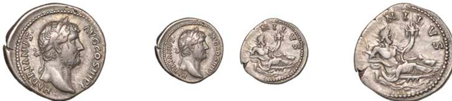
1316 Hadrian , Denarius, 130-3, laureate bust right, rev. Nile reclining right, 3.22g (RIC 1543; RSC 991). Very fine £100-£120