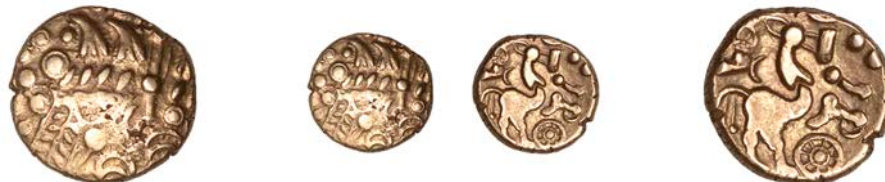
1010 BELGAE , Early Uninscribed series, Stater, Cheriton Wheel type, wreath decorated with various annulets and pellets, rev. triple-tailed horse right, wheel below, charioteer's arm above, 5.22g (Sills 213; ABC 758; BMC 446, same obv. die; S -). A few die-breaks on obverse, otherwise very fine, very rare £700-£900 Provenance: found near Grace's Farm, Easton (Hampshire), in January 2022