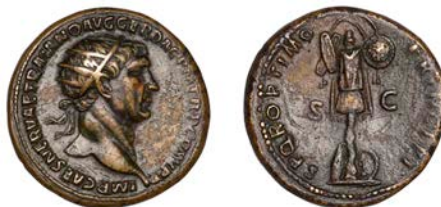
1303 Trajan , Dupondius, Rome, 103-11, radiate bust right, rev. SPQR OPTIMO PRINCIPI, trophy of arms, two shields at base, s c in field, 14.00g (RIC 586; C 573). Scratches in reverse fields, otherwise good very fine, excellent portrait £300-£360