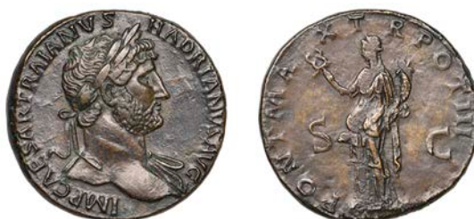
1306 Hadrian , Sestertius, Rome, 119-20, laureate bust right, draped over far shoulder, rev. Felicitas standing left, holding caduceus and cornucopia, 25.18g (RIC 244; BMC 1153). Light smoothing in fields, otherwise good very fine, strong portrait £120-£150