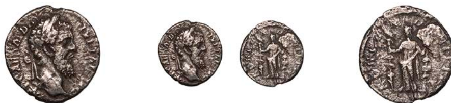
1346 Didius Julianus , Denarius, 193, laureate head right, rev. Concordia standing left, holding two standards, 2.01g (RIC 1; RSC 2). Fine, reverse somewhat corroded £120-£150