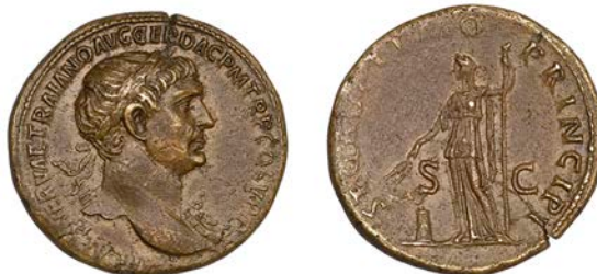
1302 Trajan , Sestertius, 103-11, laureate bust right, draped over far shoulder, rev. SPQR OPTIMO PRINCIPI, Ceres standing left, holding ears over modius and sceptre, 24.60g (RIC 478). Striking split and traces of porosity, otherwise good very fine, tan patina £300-£400 Provenance: reportedly found in the river Thames