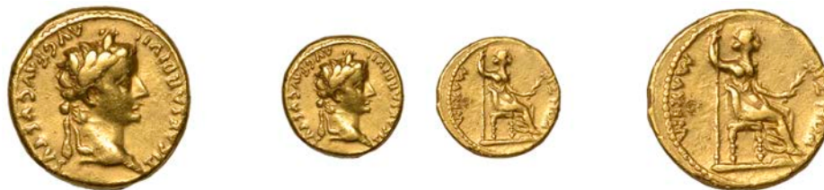
1260 Tiberius , Aureus, Lugdunum, after 16 AD, laureate bust right, rev. Livia seated right, holding olive-branch and long vertical sceptre, ornate legs to chair, 7.68g (RIC 27; BMC 39-41; Calicó 305a). Removed from a mount, very fine £1,500-£1,800