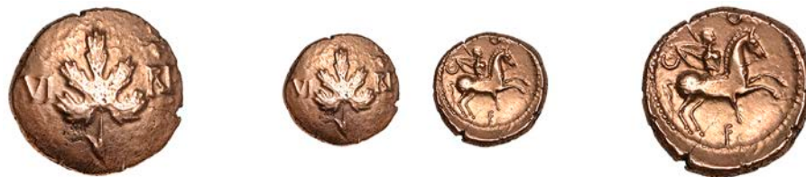
A Verica Stater from the Hatfield Hoard (1992)

Provenance: found as part of the dispersed Chawton Hoard (Hampshire) in 2012 (PAS HAMP-6DFB33)