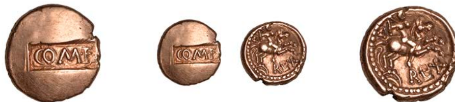
A Verica Stater from the Chawton Hoard (2012)