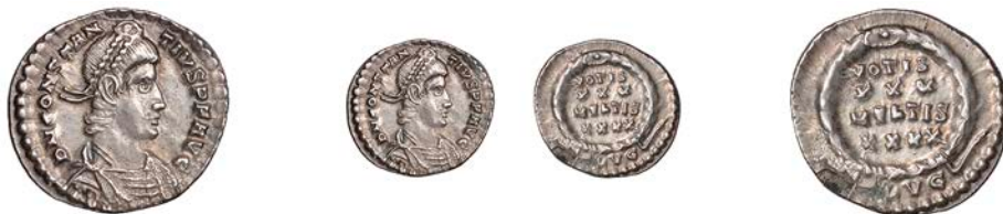
1380 Constantius II , reduced Siliqua, Lugdunum, 360-1, pearl-diademed, draped and cuirassed bust right, rev. VOTIS XXX MVLTVS XXXX in four lines within wreath, LVG in exergue, 1.89g (RIC 216; RSC 342-3a). Small metal flaw at 7 o'clock on reverse, otherwise better than very fine, toned £90-£120