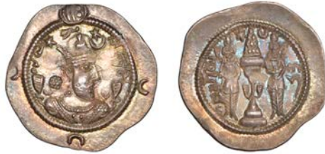
1162 SASANIAN, Khusraw I , Drachm, DR (unidentified mint), yr 21, 4.15g/3h (Göbl II/2; NMI –). Extremely fine and toned, rare £100-£120