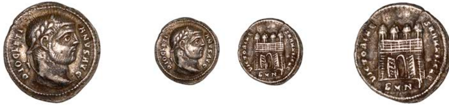
1373 Diocletian , Argenteus, Nicomedia, 295-6, DIOCLETIANVS AVG, laureate head right, rev. VICTORIAE SARMATICAЕ, four-turreted gateway to military camp, doors thrown open, SMNT in exergue, 3.17g (RIC 22a; RSC 492). Very fine, clear portrait £90-£120