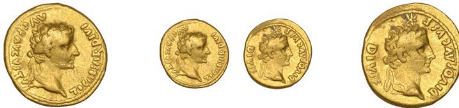
1259 Tiberius , Aureus, Lugdunum, 14-16, TI CAESAR DIVI AVG F AVGVSTVS, laureate head of Tiberius right, rev. DIVOS AVGVST DVI F, laureate head of Augustus right, star above, 7.73g/6h (RIC 24; BMC 29; Calicó 111). A few light surface marks, otherwise very fine and very rare £4,000-£5,000