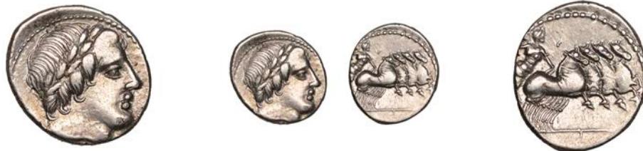
1219 Anonymous , Denarius, c. 86, laureate head of Apollo right, rev. Jupiter in quadriga right, 3.70g (Craw. 350A/2; RSC 226). Very fine £100-£120