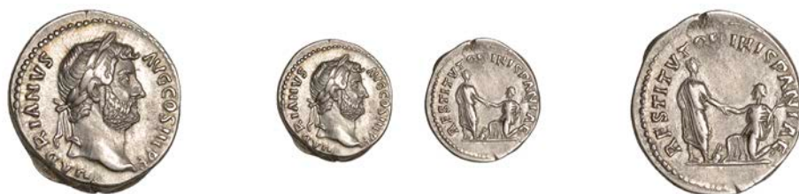
1318 Hadrian , Denarius, 130-3, laureate bust right, rev. Emperor standing right, about to raise Hispania kneeling left and holding branch, rabbit between them, 3.17g (RIC 1584; RSC 1270). Very fine or better £100-£120