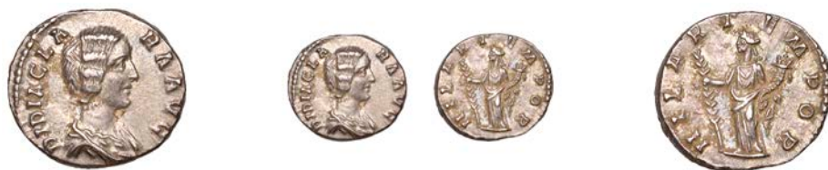
1343 Didia Clara , Denarius, 193, DIDIA CLARA AVG, draped bust right, rev. HILAR TEMPOR, Hilaritas standing left, holding palm and cornucopia, 2.49g (RIC 10; RSC 3; BMCRE 14; RCV 6086). Trifling marks and earthen surface deposits, otherwise about extremely fine, rich toning with iridescence around devices; extremely rare thus, particularly so with a British find-spot provenance £900-£1,200 Provenance: found near Eshton (North Yorkshire) in 2021 (PAS SWYOR-7D4B98)