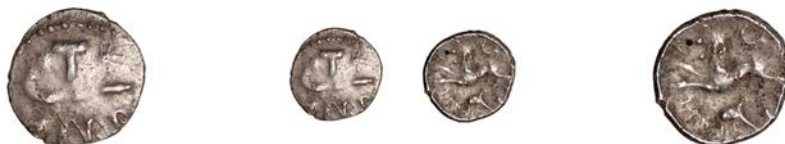
1013 ATREBATES and REGNI, Tincomarus , silver Unit, TINC cruciform around pellet, rev. lion leaping left over bucranium, 1.20g (ABC 1121; BMC 930; S 87). About very fine. £120-£160 Provenance: found in Hampshire