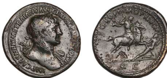
1304 Trajan , Sestertius, 107, laureate bust right, draped over far shoulder, rev. Emperor on horseback right, brandishing spear at fallen Dacian soldier, 26.54g (RIC 534; RCV 3204). Some pitting, otherwise about very fine, dark green patina £120-£150 Provenance: W.C. Boyd Collection, Baldwin Auction 42, 26 September 2005, lot 335 [bt W.S. Lincoln 1901]