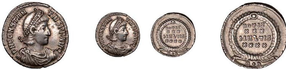
1378 Constantius II , Heavy Siliqua, Constantinople, 351-55, pearl-diademed, draped and cuirassed bust right, rev. VOTIS XXX MVLTVS XXXX in four lines within wreath, c.Δ in exergue, 3.13g (RIC VIII 102; RSC 342-3j). Small flan flaw in field, otherwise very fine, toned £150-£180

Provenance: DNW Auction A13, 25 September 2012, lot 3775