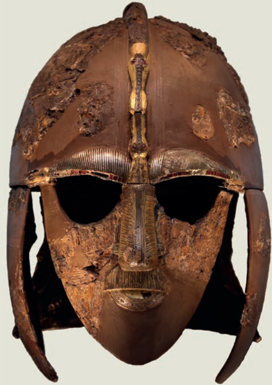
Above: The Sutton Hoo helmet.

The iconic Sutton Hoo helmet dating from the 7th century is an earlier example of an iron helmet which was richly ornamented giving it a status befitting a king. The decorated sheets of tinned bronze were applied to the surface using dies similar to our example. This process was called 'pressblech' which allowed mass production using a single die. Pressing thin sheets of metal, which can be of bronze, silver or gold into the die creates a mirror image of the design which are then applied to the surface of the helmet. The decorative panels created are lightweight but with a detailed image in relief. This process is similar to the metal working technique called repoussé where pressure is applied from the reverse side to create a detailed design in relief.