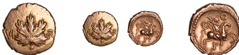
A Verica Stater from the Chawton Hoard (2012)

Provenance: from the Hatfield (Hertfordshire) Hoard, 1992; DNW Auction 42, 8 September 1999, lot 120; Chris Rudd FPL 54, November 2000 (25); J. Hall Collection, DNW Auction 70, 20 June 2006, lot 240