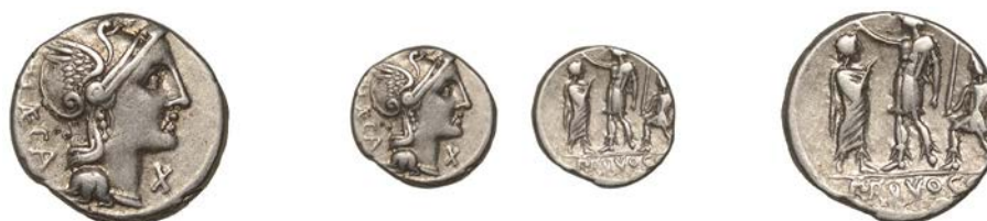
1209 Publius Laeca , Denarius, c. 110-109, helmeted head of Roma right, LAECA behind, x below chin, rev. warrior standing left, placing hand above the head of a citizen; to right, lictor standing left, 3.99g (Craw. 301/1; BMCRR Italy 649-51; RSC Porcia 4). Nearly very fine, scarce £80-£100