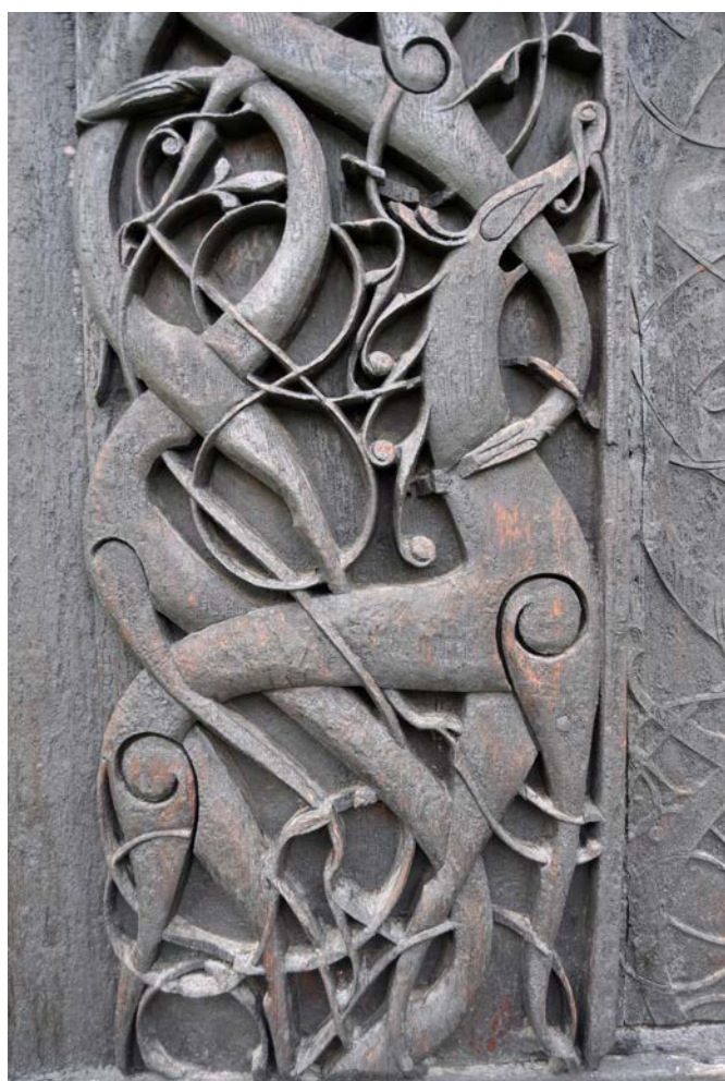
Above: Detail of the carving on the doors of the stave church at Urnes

This church has been excavated and originally dates to the 11th century, but was rebuilt in the 12th century with the Urnes style decorated staves being placed in the new building. The staves were originally planks set directly into the ground, but because the wood rotted away, sills or stone foundations were used to protect the wood.