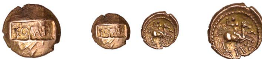
A Verica Stater from the Chawton Hoard (2012)

It is possible that this coin was struck from a very late reverse die with the R missing; this variety is not noted by Sills. The curved crescent behind the horse, normally referred to as a lituus also closely resembles a woad grinder.