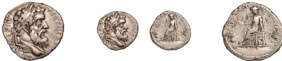
1342 Pertinax , Denarius, 193, laureate bust right, rev. Opus seated left, holding corn ears in hand, 2.54g (RIC 8a; RSC 33). Very fine, toned £200-£260