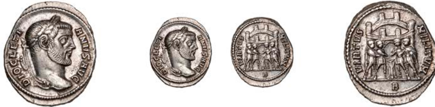
1374 Diocletian , Argenteus, Rome, 295-7, DIOCLETI-ANVS AVG, diademed bust right, rev. VIRTVS MILITVM, Diocletian, Maximian, Constantius Chlorus and Galerius sacrificing over tripod, six-turreted fortress behind, B in exergue, 3.41g (RIC 34a; RSC 412b). Good very fine, attractive bright fields £300-£400