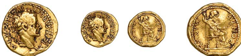
1261 Tiberius , Aureus, Lugdunum, after 16 AD, laureate bust right, rev. PONTIF MAXIM, Livia seated right, holding olive-branch and long vertical sceptre, ornate legs to chair, 7.67g (RIC 27; BMC 39-41; Calicó 305a). Good fine with dirt in the detail, and surface marks on the reverse £1,000-£1,200