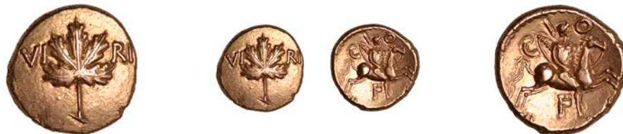
A Verica Stater from the Chawton Hoard (2012)