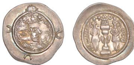
1165 SASANIAN, Khusraw I , Drachm, ST (Istakhr), yr 23, 4.13g/2h (Göbl II/2; NMI –). About extremely fine, toned £80-£100