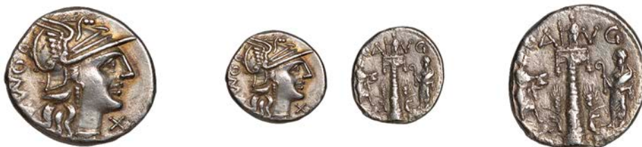
1205 C. Augurinus , Denarius, c. 135, helmeted head of Roma right, ROMA behind, x below chin, rev. c AVG above Ionic column surmounted by statue; at base, two stalks of grain; on left, L. Minucius Augurinus standing right, holding patera, foot on modius; on right, M. Minucius Faesus standing left, holding lituus, 3.59g (Craw. 242/1; BMCRR 952-4; RSC Minucia 3). Some surface marks, otherwise good very fine, toned £90-£120