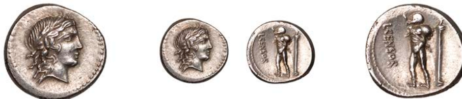
1222 L. Censorinus , Denarius, c. 82, laureate head of Apollo right, rev. Marsyas standing left, hand raised, with wine-skin on shoulder, column surmounted by statuette behind, L CENSOR before, 3.71g (Craw. 363/1d; RSC Marcia 24). About extremely fine £150-£180