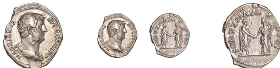
1322 Hadrian , Denarius, 133-5, bare-headed draped bust right, rev. Hadrian standing right, holding volumen and clasping right hand of Felicitas standing left, holding cornucopiæ, 3.33g (RIC 2001; RSC 789d). Good very fine £100-£120