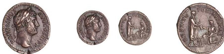
1317 Hadrian , Denarius, 130-3, laureate bust right, rev. Hadrian standing right, holding volumen, about to raise Africa who is kneeling left, holding grain ears and wearing elephant skin headdress; between them, stalks of grain, 3.26g (RIC 1569; RSC 1229). Very fine, scarce thus £120-£150