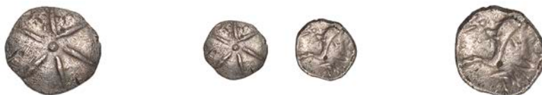
1014 ATREBATES and REGNI, Tincomarus , silver Unit, dolphin type, star of six limbs, rev. boy on dolphin right, 1.30g (ABC 1127; VA 371-1; S 88). Good fine £60-£80