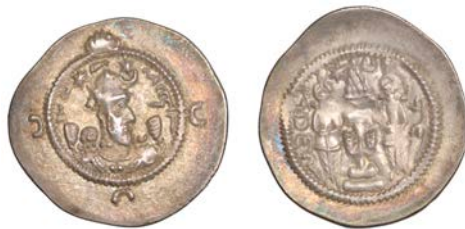
1164 SASANIAN, Khusraw I , Drachm, RD (Rayy), yr 19, 4.12g/3h (Göbl II/2; NMI –). About extremely fine, toned £80-£100