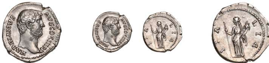
1315 Hadrian , Denarius, 130-3, laureate bust right, rev. Italia standing left, holding sceptre and cornucopiæ, 3.33g (RIC 1540; RSC 867). Good very fine £100-£120