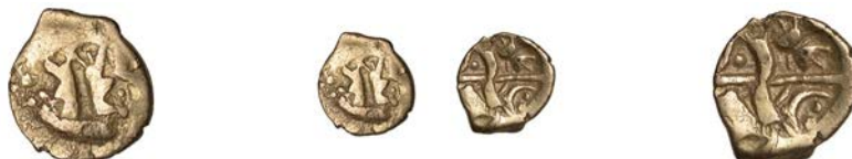
1011 BELGAE , Early Uninscribed series, Quarter-Stater, British O [Hampshire Thunderbolt type], stylised boat with two standing figures, rev. cruciform thunderbolt motif, 1.21g (ABC 767; BMC 129-36; S 46). Hairline crack, otherwise about very fine, scarce £100-£150 Provenance: found near Hambleton, Hampshire, in 2015