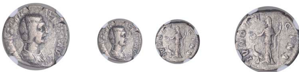
1347 Manlia Scantilla , Denarius, 193, rev. Juno standing left, holding patera and sceptre, peacock at her feet, (RIC Didius Julianus 7a; RSC 2). Good fine [slabbed NGC Choice Fine] £400-£500