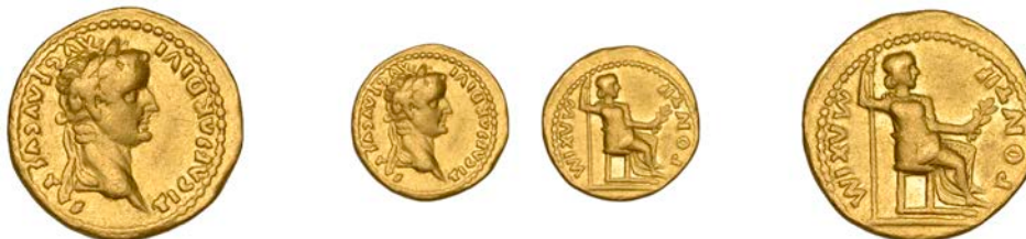
1263 Tiberius , Aureus, Lugdunum, after 16 AD, TI CAESAR DIVI AVG F AVGVSTVS, laureate bust right, rev. PONTIF MAXIM, Livia seated right, holding olive-branch and long vertical sceptre, plain legs to chair, 7.61g/9h (RIC 29; BMC 46; Calicó 305d). Very fine, well-centred £3,000-£4,000