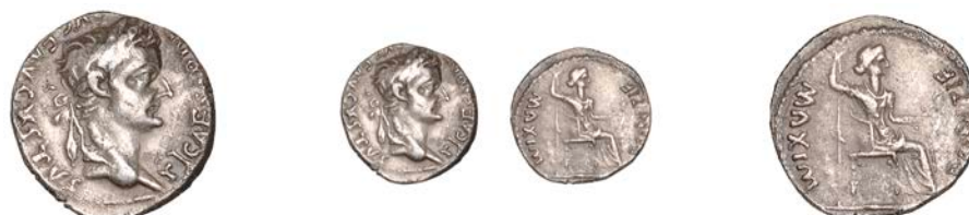
1264 Tiberius , Denarius, Lugdunum, after 16 AD, laureate bust right, rev. Livia seated right on ornate stool, holding sceptre and olive branch, 3.28g (RIC 30; RSC 16a; RCV 1763). Good very fine, strong portrait £120-£150