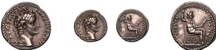
1262 Tiberius , Denarius, Lugdunum, after 16 AD, laureate head right, rev. PONTIF MAXIM, Livia seated right on ornate stool, holding sceptre and olive branch, 3.84g (RIC 28; RSC 16b; RCV 1763). About extremely fine, well-centred and attractively toned £400-£500