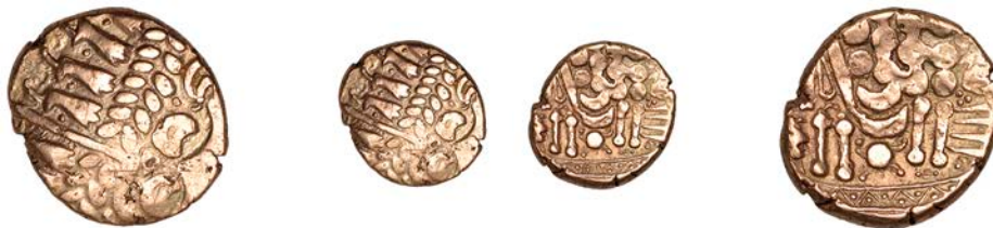
1009 BELGAE , Early Uninscribed issues, Stater, British D [Chute/Cheriton transitional type], degraded head of Apollo right, wreath running downwards, rev. disjointed horse left with four-lined tail, coffee-bean and small trefoil behind, crab-like object below, 5.67g (Sills 311 [O11/R9]; ABC 752; BMC 111, same dies; S 22). Very fine, attractive coppery gold, scarce £300-£360 Provenance: found near Corhampton, Hampshire, in 2018