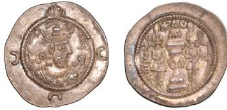
1163 SASANIAN, Khusraw I , Drachm, GD (Jayy), yr 22, 4.15g/3h (Göbl II/2; NMI 717-9). Extremely fine, toned £100-£120