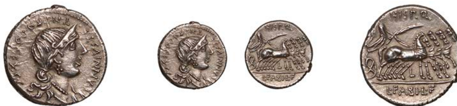
1223 C. Annius T.f. T.n. and L. Fabius L.f. Hispaniensis , Denarius, 82-1, mint in northern Italy or Spain, draped and diademed bust of goddess right, rev. Victory driving quadriga right, L below horses, 3.89g (Craw. 366/3b; RSC Annia 5). Sometime cleaned with light surface porosity, otherwise about extremely fine, scarce £150-£180