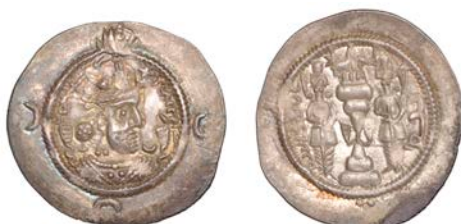
1166 SASANIAN, Khusraw I , Drachm, ST (Istakhr), yr 24, 4.11g/2h (Göbl II/2; NMI 855). Extremely fine, toned £100-£120