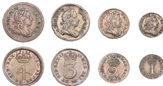
434 Maundy set, 1727 (ESC 1618; S 3658) [4]. Very fine to extremely fine, toned

Provenance: Heritage Auction (New York), 20 January 2014, lot 28422