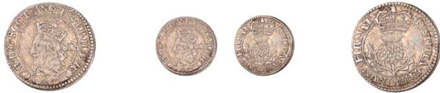
715 Charles I , Third coinage, Briot's issue, Twenty Pence, no mm., signed v below chin on obv. and above crown on rev. , 0.80g/3h (Murray j/h; B 18; S 5584). Very fine and toned £100-£120