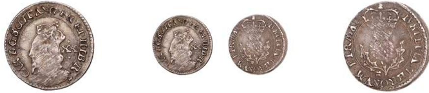
714 Charles I , Third coinage, Briot's issue, Twenty Pence, no mm., signed v below bust on obv. and below thistle on rev. , 0.74g/6h (Murray a/e; B –; S 5582A). Centres weak, otherwise good very fine £100-£120