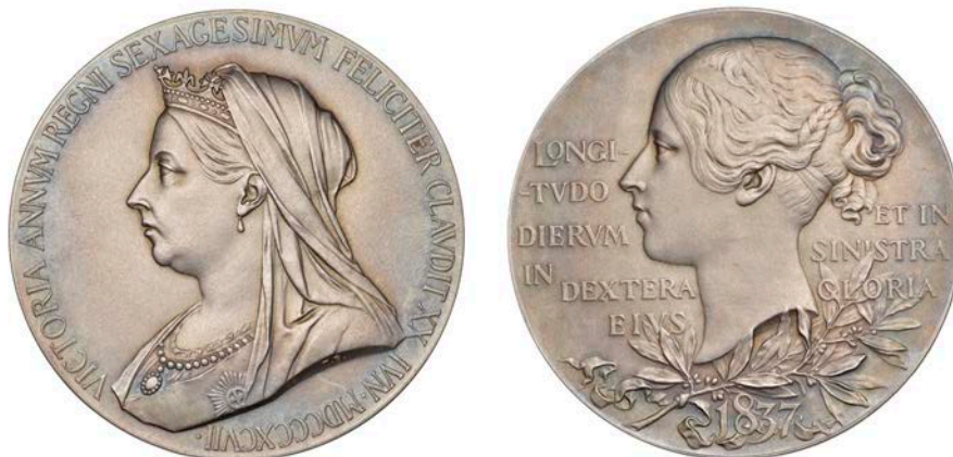
1320 Victoria, Diamond Jubilee , 1897, a silver medal by G.W. de Saulles, veiled bust left, rev. young head left, 55mm, 84.57g (W & E 3000A.4; BHM 3506; E 1817a). Extremely fine or better, lightly toned; in case of issue £80-£100