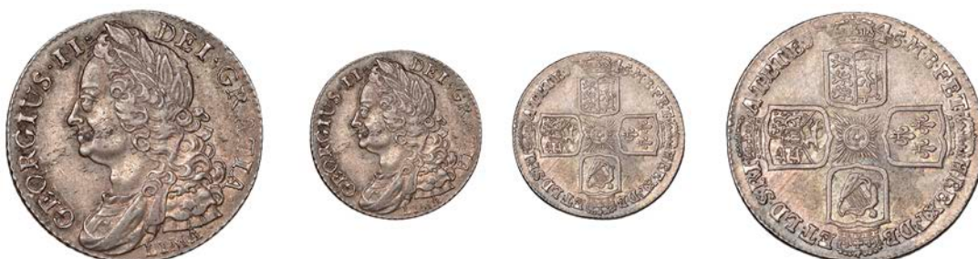
327 Shilling, 1745, LIMA (ESC 1724; S 3703). Some fleckmarks, good very fine, dark tone