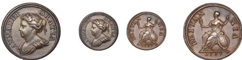
429 Pattern Farthing, 1714, by J. Croker, in copper, bust left, rev. Britannia seated left, edge plain, 5.53g/6h (Cooke –; BMC 741; S 3625). Good very fine, dark brown patina