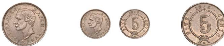
1133 Charles J. Brooke , 5 Cents, 1913H (Prid. 25; KM 8). About extremely fine £100-£120