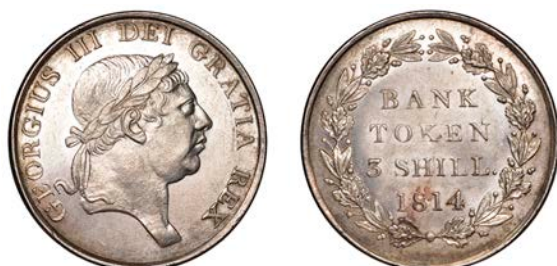
481 Three Shillings, 1814 (ESC 2083; S 3770). About mint state £200-£300