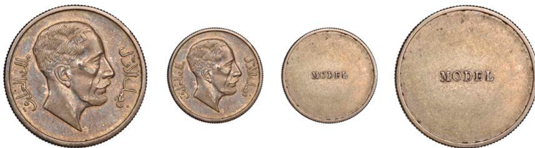
1109 Faisal I , Model 50 Fils, undated, struck at the Royal Mint, 9.11g/12h (cf. KM 100). Very fine and extremely rare, apparently unrecorded £1,000-£1,200