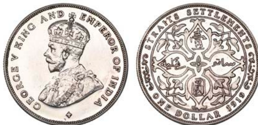
1168 George V , restrike Proof Dollar, 1919 (cf. Prid. 9; KM 33). Brilliant, about as struck