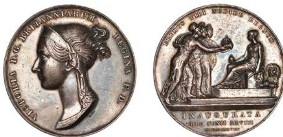
1285 Victoria, Coronation , 1838, a silver medal by B. Pistrucci, diademed bust left, rev. Victoria seated left, being offered the crown by Britannia, Scotia, and Hibernia, 37mm, 19.54g (VW & E 88A.2; BHM 1801; E 1315). A few surface marks, good very fine, toned £300-£400