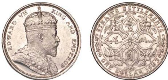
1167 Edward VII , Dollar, 1903 B (Prid. 1; KM 25). Minor marks in obverse fields, otherwise extremely fine