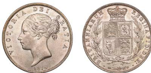
592 Halfcrown, 1874 (ESC 2741; S 3889). Extremely fine