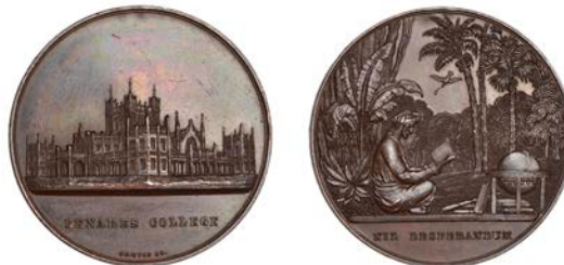
1239 INDIA, Benares College , Tucker Medal, a specimen bronze award by J.S. Wyon, undated, view of the college, rev. scholar seated in garden, reading book, edge stamped '42', 32mm (Pudd. 872.4). Good extremely fine, very rare £200-£260