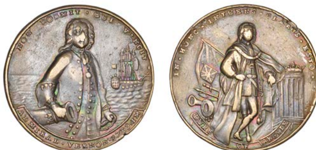
1258 Admiral Vernon and the Duke of Argyll , 1739, a pinchbeck medal signed I.M., half-length figure of Vernon three-quarters right, hand on cannon, ship to right, rev. Argyll standing, resting left arm on column, 40mm (Adams NLv 4-D; Betts 245; MI II, 560/188; E 553). Cleaned, otherwise very fine, rare £150-£180