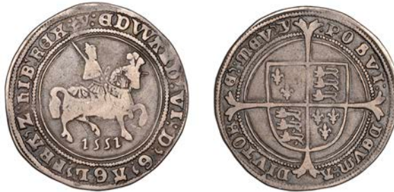
232 Third period, Fine issue, Halfcrown, 1551, mm. y, walking horse with plume, 15.28g/9h (N 1934; S 2479). Good fine, some toning £600-£700