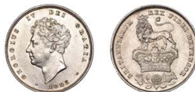
532 Shilling, 1825, type 3 (ESC 2405; S 3812). Extremely fine, residual lustre