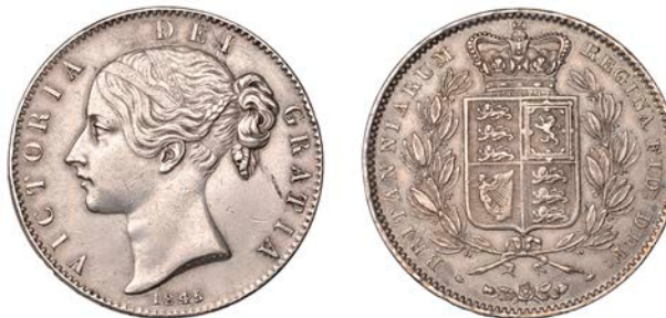
570 Crown, 1845, edge VIII, cinquefoil stops (ESC 2564; S 3882). Lightly wiped, otherwise good very fine, grey tone