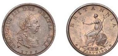
468 Restrike Proof Farthing, 1799, in bronzed-copper, edge plain, 6.29g/6h (BMC 1281 [R 86]; S 3779). Developed die flaw under bust, extremely fine, a few marks