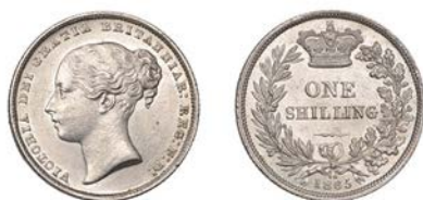
619 Shilling, 1865, die 34 (ESC 3025; S 3905). A few light marks, otherwise extremely fine or better