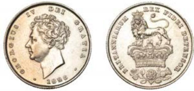
534 Shilling, 1826 (ESC 2409; S 3812). About extremely fine