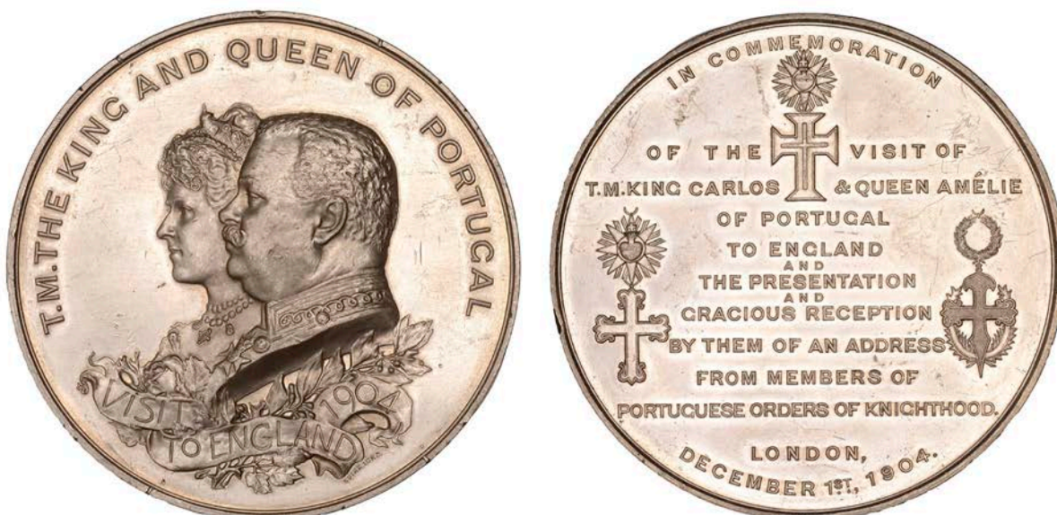
1332 Visit of the King and Queen of Portugal to London , 1904, a white metal medal by Spink, conjoined busts left, rev. legend, 76mm (BHM 3904). A few minor marks, about extremely fine, very rare £120-£150

Provenance: Münzen Gut-Lynt Auction 6, 19 June 2022, lot 1005