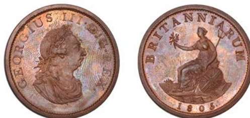
466 Restrike Pattern Halfpenny, 1805, after C.H. Küchler, in copper, laureate bust right, rev. Britannia seated left, edge plain, 12.73g/6h (cf. BMC 1309 [R 91]; Selig 1399). Virtually as struck, mirror-like fields, extremely rare