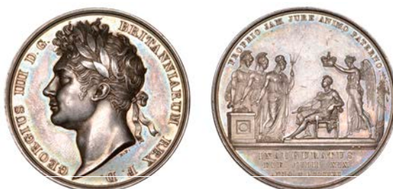
1272 George IV, Coronation , 1821, a silver medal by B. Pistrucci, laureate head left, rev. Britannia, Scotia and Hibernia approaching the enthroned king being crowned by Victory, 35mm, 16.58g (BHM 1070; E 1146a). Extremely fine, toned £400-£500

Provenance: DNW Auction 193, 6 July 2021, lot 1216