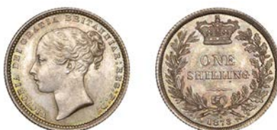
622 Shilling, 1873, die 19 (ESC 3043; S 3906A). Virtually as struck, lightly toned