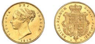
G 564 Half-Sovereign, 1864, die 19 (M 440; S 3860). Very slightly bent, otherwise about extremely fine