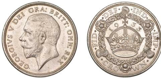
670 Crown, 1933 (ESC 3644; S 4036). Some minor marks, about extremely fine