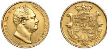
G 543 Sovereign, 1837 (M 21; S 3829B). Very fine