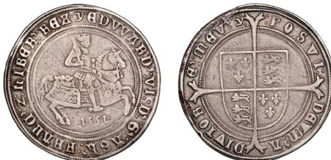
230 Third period, Fine issue, Crown, 1551, mm. y, 30.21g/6h (Lingford dies A-5; N 1933; S 2478). A few light marks, good fine £800-£1,000