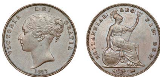
629 Penny, 1857, close colon (BMC 1514; S 3948), Extremely fine or better £120-£150