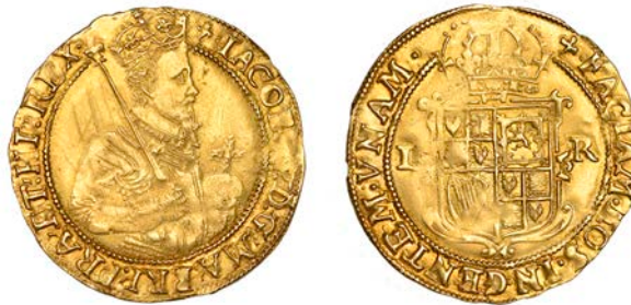
278 Second coinage, Unite, mm. trefoil, fourth bust, 9.98g/9h (SCBI Schneider –; N 2085; S 2620). Light scratches across obverse, otherwise very fine £1,200-£1,500