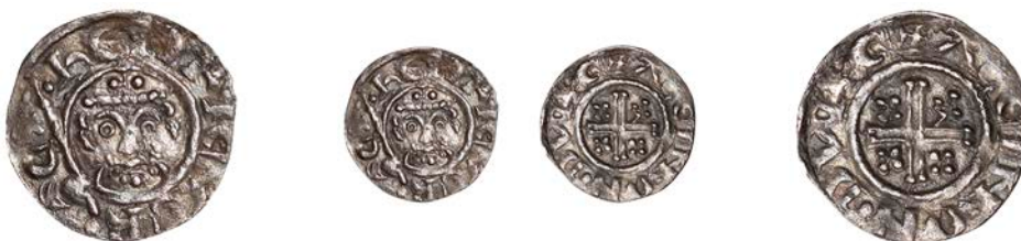
11 Penny, class IVa, Durham , Alein, ALEIN . ON . DVRE, dies 435/433, 1.01g/1h (Durham Mint 15b; SCBI Mass 961, same dies; N 968/1; S 1348A). Peripheral roughness, about very fine, rare £200-£260