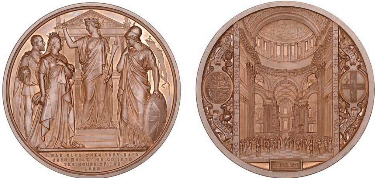
1199 National Thanksgiving for the Prince of Wales , 1872, a bronze medal by J.S. & A.B. Wyon for the Corporation of the City of London, Londinia inviting Queen Victoria and the Prince of Wales to enter St Paul's Cathedral, rev. interior of the Cathedral, 77mm (W & E 1160A.1; BHM 2928; E 1618; Taylor 39k). Extremely fine; in fitted case of issue by Wyon, 287 Regent Street, London £500-£700

Provenance: A Collection of City of London Medals, the Property of a Gentleman, DNW Auction 138, 12 December 2016, lot 2715