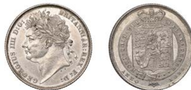
531 Shilling, 1825, type 2 (ESC 2402; S 3811). A few light marks, otherwise extremely fine