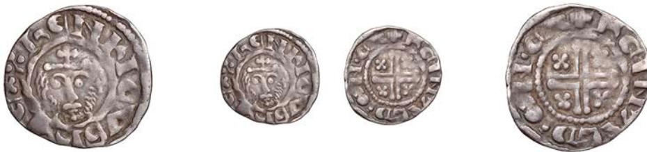
9 Penny, class IIIab1, Canterbury , Reinald, REINALD . ON . CA, portrait with excessive hair and beard curls, N in HENRICVS double-barred, 1.40g/8h (SCBI Mass —; N 967; S 1347). Nearly very fine, dark toned, the obverse die of irregular style £90-£120 Provenance: Glendining Auction, 6 November 1985, lot 55