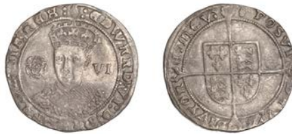
239 Third period, Fine issue, Sixpence, mm. tun, crown with frosted caul, 2.96g/12h (N 1938; S 2483). Creased with minor stress marks, good very fine