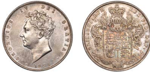
525 Halfcrown, 1825 (ESC 2371; S 3809). About extremely fine