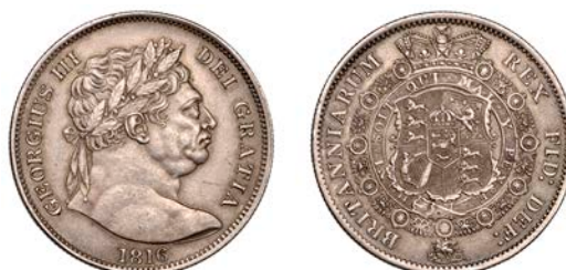
494 Halfcrown, 1816, over 1814 (ESC 2086; S 3788). Sometime wiped and now with a dull grey tone, extremely fine