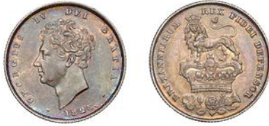
533 Shilling, 1826 (ESC 2409; S 3812). Good extremely fine, richly toned, residual lustre Provenance: DNW Auction 129, 18 March 2015, lot 452