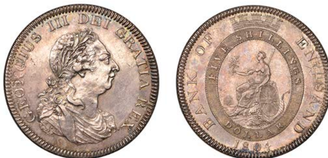
475 Dollar , 1804, types A/2 (ESC 1925; S 3768). A few surface marks, otherwise nearly extremely fine £240-£300