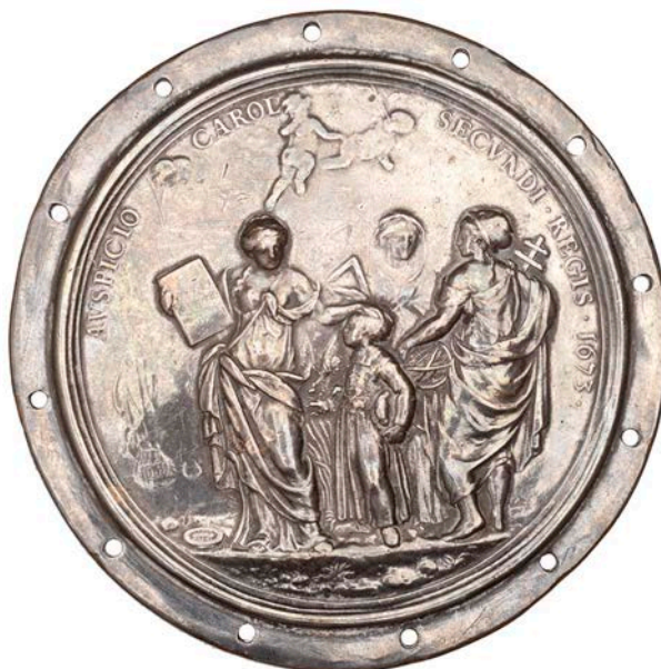
1245 Christ's Hospital, Nautical School, 1673 , a uniface silver cloak badge by J. Roettiers, standing figures of Arithmetic, Geometry and Astronomy encouraging a Bluecoat boy, fleet behind, 80mm, 43.60g (MI I, 557/218; E 252). About very fine; the wide border with twelve piercings for attachment £100-£120