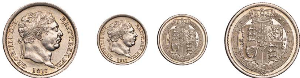
332 Shilling, 1817, appears to read RRIITT (ESC 2144; S 3790). About as struck, rare