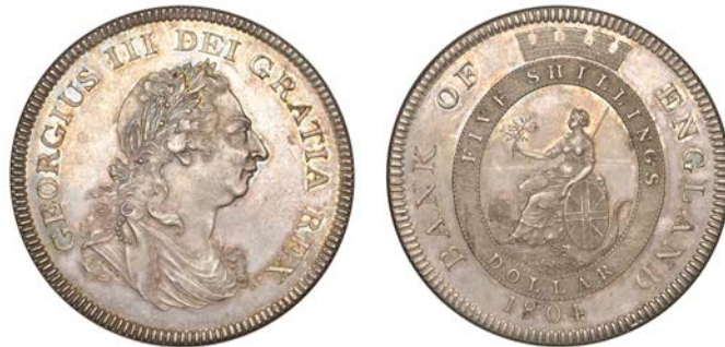
478 Proof Dollar, 1804, by C.H. Kuchler, types D/2a, κ inverted, 27.07g/12h (ESC 1946; S 3768). Two light scratches in obverse field, otherwise extremely fine, attractively toned and rare £2,000-£2,600