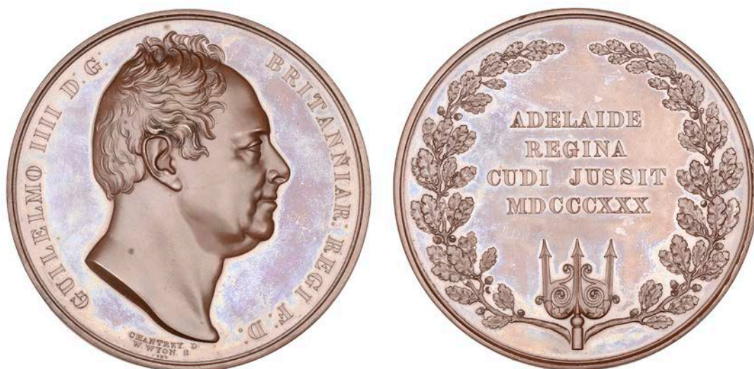
1275 William IV, Accession , 1830, a bronze medal by W. Wyon, bust right, rev. legend within wreath, 67mm (BHM 1414; E 1220). Good extremely fine, in contemporary fitted case £90-£120