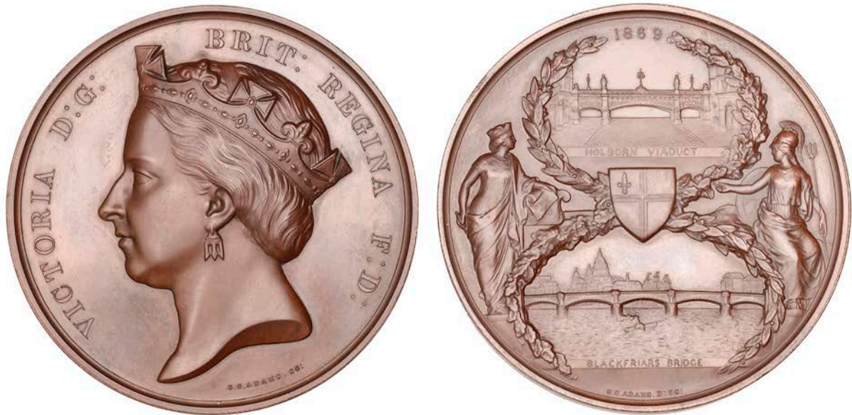
1198 Blackfriars Bridge and Holborn Valley Viaduct Opened , 1869, a copper medal by G.G. Adams, coronetted bust of Victoria left, rev. City shield dividing views of both bridges, figures of Londinia and Britannia at sides, 77mm (W & E 1126.1; BHM 2906; E 1604). Extremely fine or better; in fitted case of issue [the catch faulty] £300-£400