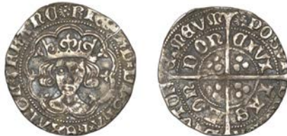
202 Groat, London, type 3, mm. halved sun and rose no. 3, pellet below bust, 2.67g/1h (Winstanley 15; N 1680; S 2158). Crack running from 2 o'clock to centre of coin, flan crimped, about very fine, dark patina £700-£900