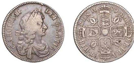
387 Halfcrown, 1670, third bust, edge VICESIMO SECVNDO (ESC 453; S 3365). Fine