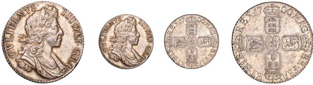
413 Shilling, 1700, fifth bust (ESC 1150; S 3516). Extremely fine and beautifully toned