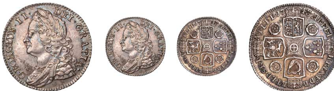
326 Shilling, 1743, roses (ESC 1720; S 3702). Minor flecking within field, good very fine, toned