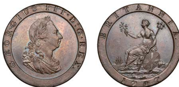
464 Penny, 1797 (BMC 1132; S 3777). Extremely fine