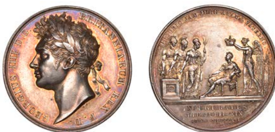
1273 George IV, Coronation , 1821, a silver medal by B. Pistrucci, laureate head left, rev. Britannia, Scotia and Hibernia approaching the enthroned King being crowned by Victory, 35mm (BHM 1070; E 1146a). Nearly extremely fine, toned £300-£400

Provenance: DNW Auction 193, 6 July 2021, lot 1216