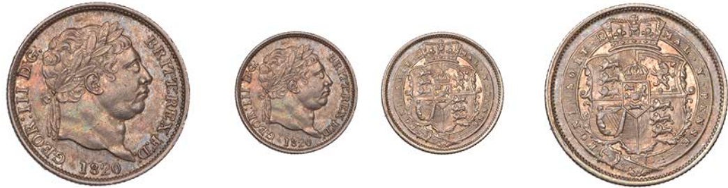
335 Shilling, 1820 (ESC 2157; S 3790). Extremely fine or a little better, richly toned