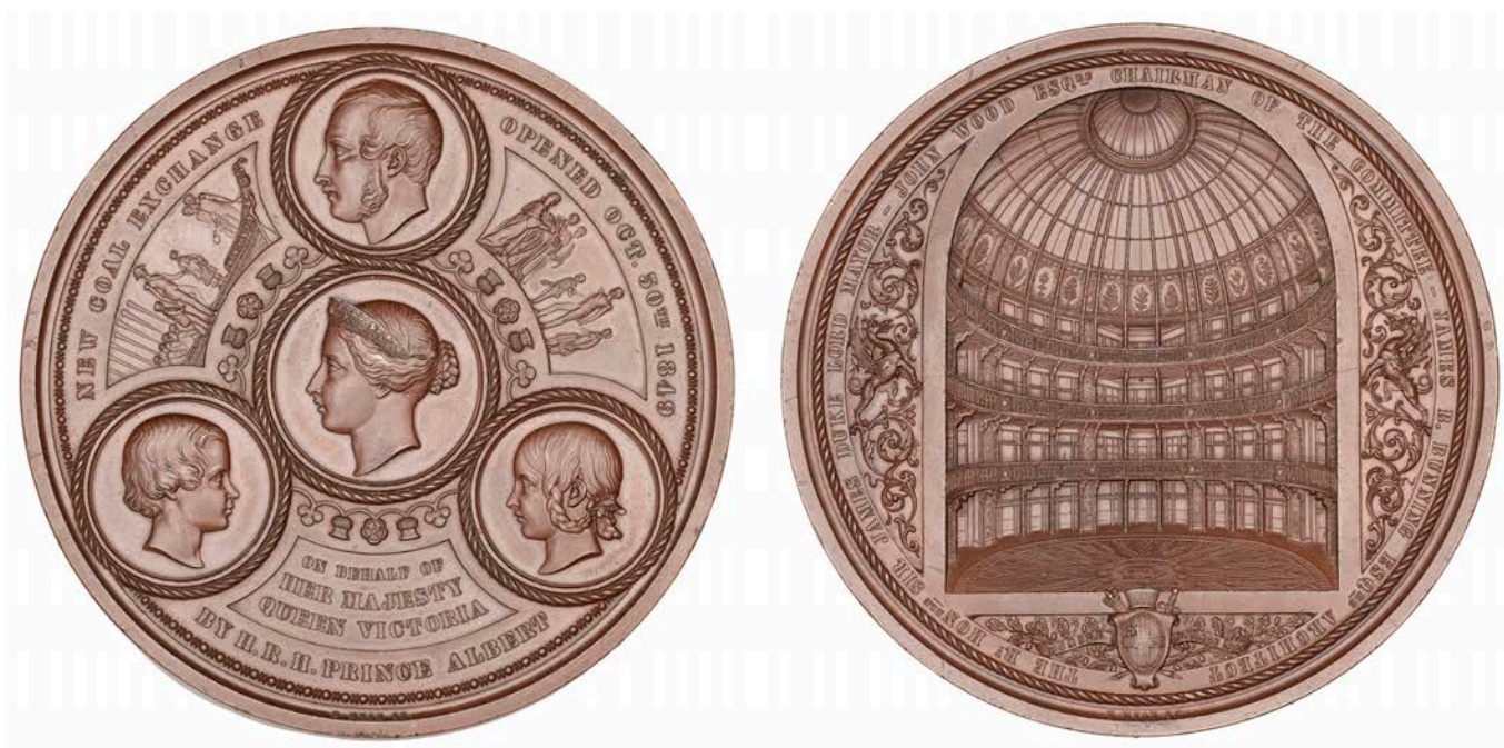
1193 Opening of the New Coal Exchange , 1849, a copper medal by B. Wyon for the Corporation of the City of London, medallion portraits of the Queen, Prince Albert, the Prince of Wales and the Princess Royal, rev. interior of the Coal Exchange, 89mm, flan thickness 10mm (W & E 581A.2; Taylor 161c; BHM 2357; E 1435). Extremely fine, the thick-flan variety rare; housed in fitted gilt-blocked case of issue £600-£800

Provenance: A Collection of City of London Medals, the Property of a Gentleman, DNW Auction 138, 12 December 2016, lot 2709