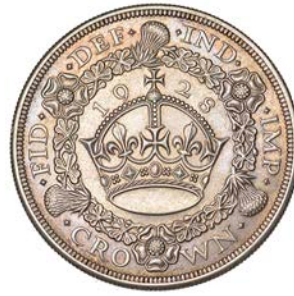
662 Crown, 1928 (ESC 3633; S 4036). Extremely fine