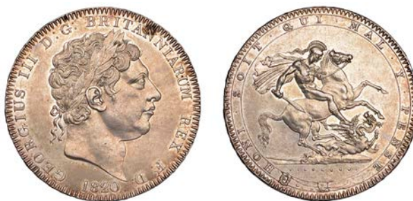
493 Crown, 1820, edge Lx (ESC 219; S 3787). About extremely fine