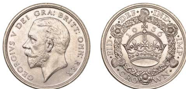
672 Crown, 1936 (ESC 3649; S 4036). Good extremely fine