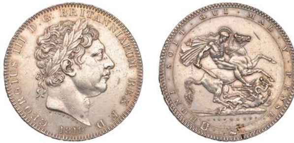
491 Crown, 1819, edge Lx (ESC 2010; S 3787). Cleaned, about extremely fine