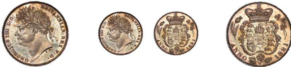
535 Sixpence, 1821 (ESC 2421; S 3813). Good extremely fine and attractively toned