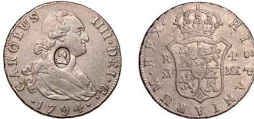
472 SPAIN, Charles IV , 4 Reales, 1794 MF , Madrid, obv. countermarked with head of George III in oval, 13.34g (ESC 1875; S 3767). Very fine, toned £300-£400