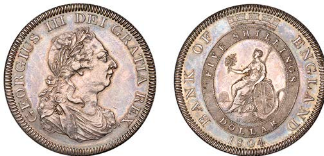
474 Dollar , 1804, types A/2 (ESC 1925; S 3768). Sometime cleaned, good very fine or a little better £300-£400