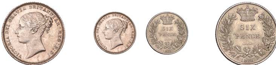
626 Sixpence, 1871, no die number (ESC 3239; S 3911). Extremely fine or better, obverse with residual lustre, reverse toned £90-£120