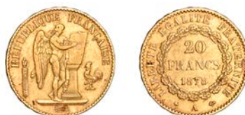
G 1075 Third Republic , 20 Francs, 1878 A (Gad. 1063; F 592). Very fine £240-£300