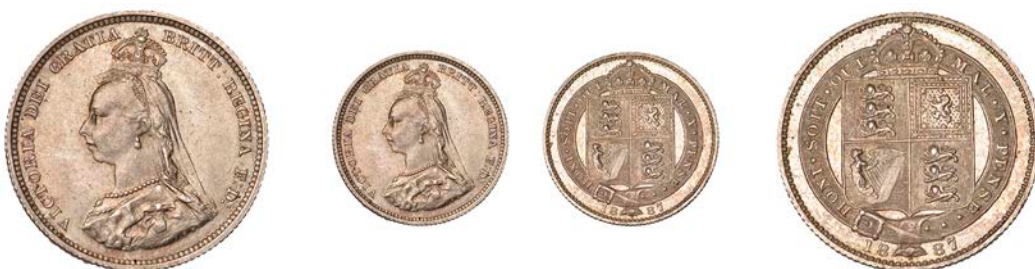
348 Shilling, 1887, Jubilee head (ESC 3137; S 3926). Light bagmarks, otherwise good extremely fine, light tone