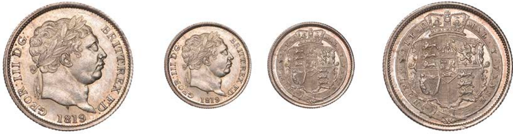
334 Shilling, 1819 (ESC 2152; S 3790). About as struck, lightly toned