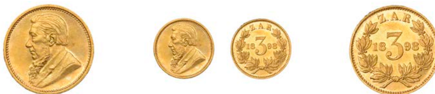
G 1139 Paul Kruger, Threepence, 1898, in gold , the so-called 'Sammy Marks ticky', edge plain, 2.63g/12h (Hern ZP5; KM Pn23; cf. DNW 75, 974). Good extremely fine