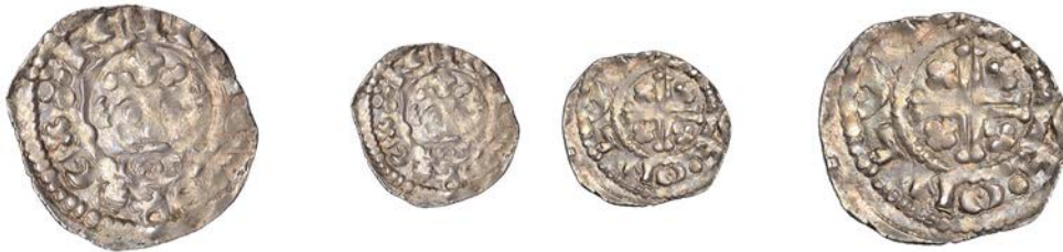
8 Penny, class II, London , Raul, [-]VL . ON . LVND, 1.45g/9h (SCBI Mass 677ff; N 965; S 1346). Minor die shift, weakly struck on an irregular flan, otherwise about very fine and probably much as struck, iridescent toning £80-£100