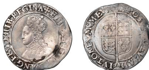
242 Second issue, Shilling, mm. cross-crosslet, bust 1A, reads ELIZABETH D G ANG FR ET HIB REGINA, 5.96g/7h (N 1985; S 2555A). Some staining and cleaned at one time, about very fine and rare