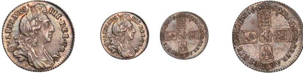
414 Sixpence, 1696, first bust, early harp (ESC 1202; S 3520). Extremely fine and toned