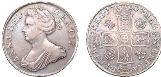
421 Crown, 1707, roses and plumes, edge SEXTO (ESC 1343; S 3578). Lightly cleaned at one time and now re-toned, otherwise good very fine £800-£1,000

Struck from the same dies as the R. Plant specimen (DNW 188, 88)