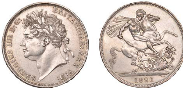
516 Crown, 1821, edge SECUNDO (ESC 2310; S 3805). Cleaned, about extremely fine