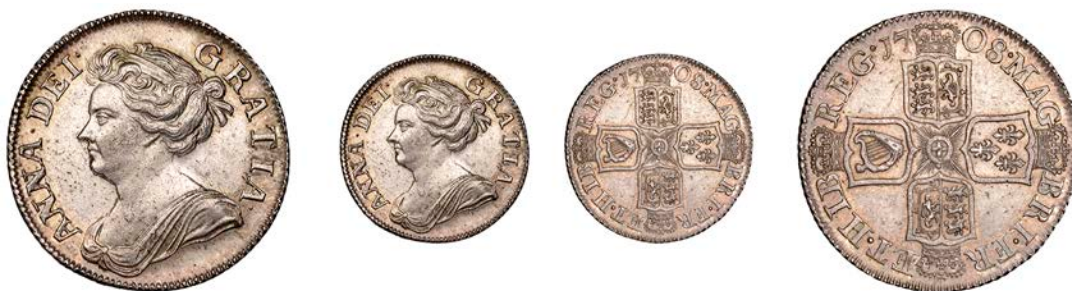
324 Shilling, 1708, third bust (ESC 1399; S 3610). Good extremely fine, lightly toned