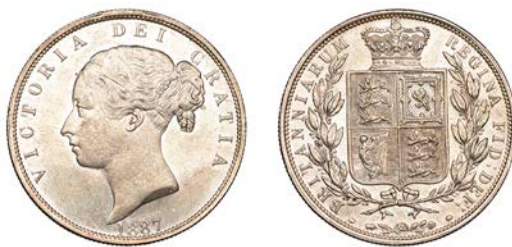
598 Halfcrown, 1887, young head (ESC 2769; S 3889). Extremely fine