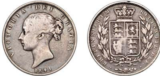
589 Halfcrown, 1841 (ESC 2716; S 3888). Fair to fine, very rare