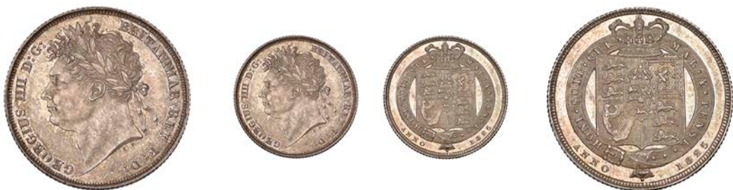
338 Shilling, 1825, type 2, top of o broken in king's name (ESC 2402; S 3811). Good extremely fine, fields bright and lustrous, grey tone

Previously encapsulated by NGC, MS 63 [2118482-006].