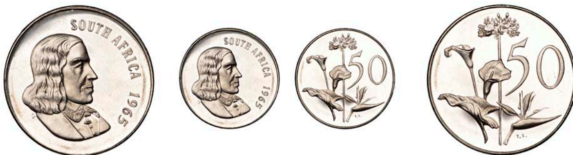
1150 Republic , Proof 50 Cents, 1965, English legend, edge plain, 9.46g/12h (Hern D190a; KM 70.1). Brilliant, extremely rare £2,000-£3,000

50 struck; not issued as a currency coin