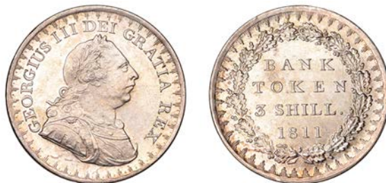
480 Three Shillings, 1811 (ESC 2065; S 3769). Good extremely fine, lightly toned £120-£150