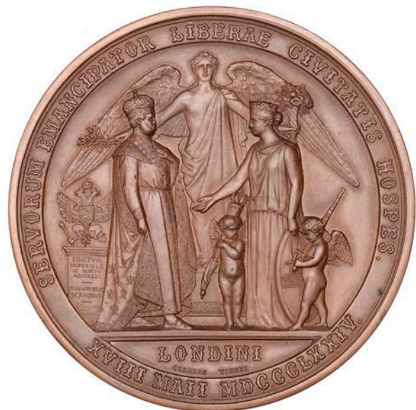
1201 Visit of Czar Alexander II to London , 1874, a bronze medal by C. Wiener for the Corporation of the City of London, uniformed bust left, rev. Alexander and Londinia standing, winged Peace behind, 77mm (Diakov 807.1; W & E 1225A.1; BHM 2981; E 1634). Extremely fine; in fitted case of issue £400-£500