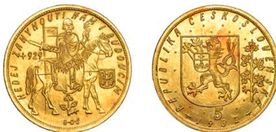
G 1064 Republic, 5 Ducats, 1932 (KM 13; F 5). Good extremely fine