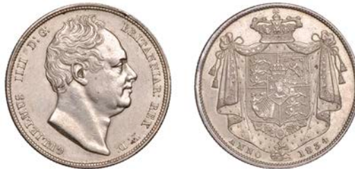
545 Halfcrown, 1834, w.w. in block (ESC 2474; S 3834A). Lightly cleaned, good very fine, scarce

Provenance: Glendining Auction, 9 September 1987, lot 25 (part lot)