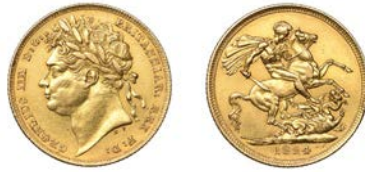
G 511 Sovereign, 1824 (M 8; S 3800). Good very fine, but surfaces dulled and marked