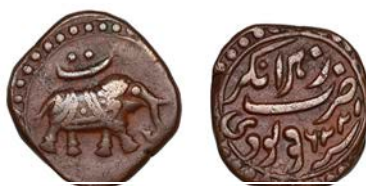
1092 MYSORE, Tipu Sultan , Paisa, Nagar, AM1226 [1798-9], 11.10g/1h (Henderson 253; KM 103.8). Very fine, struck on an almost square flan £150-£180