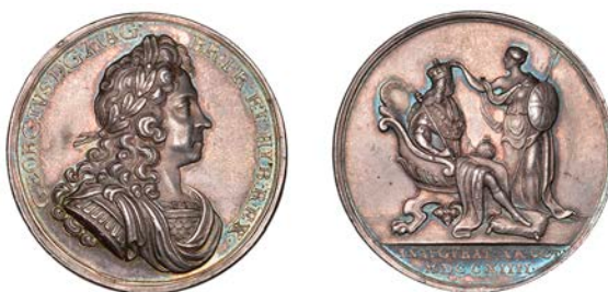
1252 George I, Coronation , 1714, a silver medal by J. Croker, laureate bust right, rev. Britannia crowning king, 34mm, 14.94g (MI II, 424/9; E 470). Extremely fine and toned £700-£900

Provenance: DNW Auction 193, 6 July 2021, lot 1207