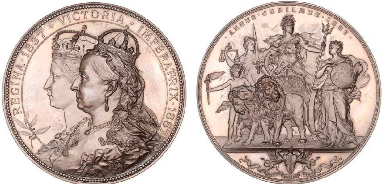
1209 Victoria, Golden Jubilee , 1887, a bronze medal by A. Scharff, for the Corporation of the City of London, conjoined crowned busts of the young and Jubilee heads of the Queen, rev. Britannia seated in car drawn by two lions, Justice and Prudence at sides, 80mm (W & E 2340.1; BHM 3284; E 1732). Extremely fine or better; in fitted Elkington & Co. case of issue £1,000-£1,200

Provenance: A Collection of City of London Medals, the Property of a Gentleman, DNW Auction 138, 12 December 2016, lot 2723