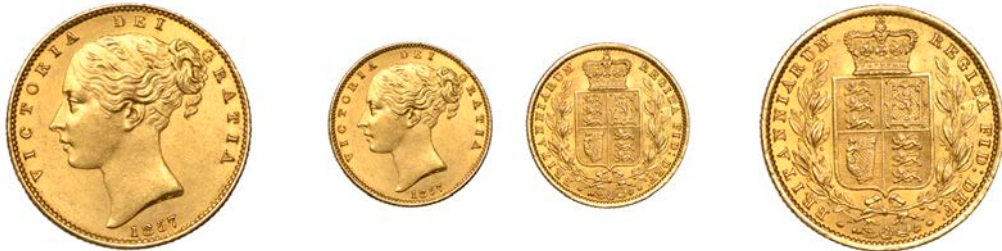
G 562 Sovereign, 1857 (M 40; S 3852D). Good extremely fine