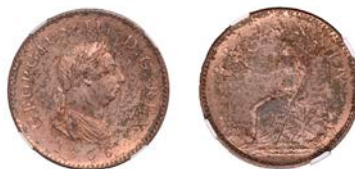
469 Farthing, 1806 (BMC 1398; S 3782). About mint state with some patchy original colour [certified and graded by NGC as MS 62 RB]