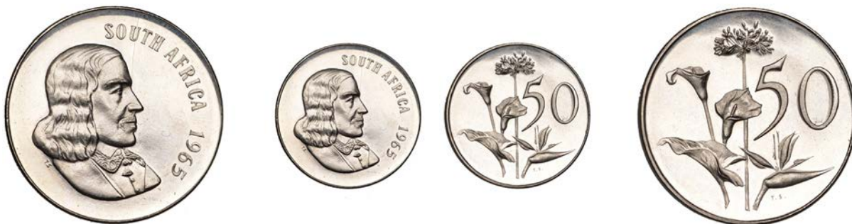
1151 Republic , Proof 50 Cents, 1965, English legend, edge plain, 9.52g/12h (Hern D190b; KM 70.1). Die crack through u of south to forehead, brilliant, the variety excessively rare £2,000-£3,000