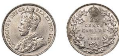
1057 George V , 25 Cents, 1915 (KM 24). Lightly cleaned, faint scratches on obverse, otherwise about extremely fine, the date scarce