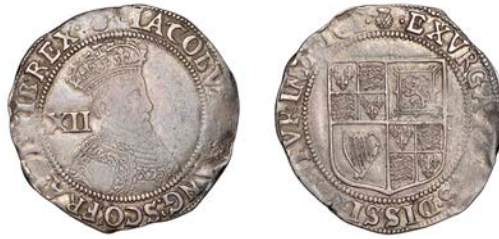
277 First coinage, Shilling, mm. thistle, second bust, 5.96g/4h (N 2073; S 2646). Weak on face, otherwise about very fine, toned £90-£120