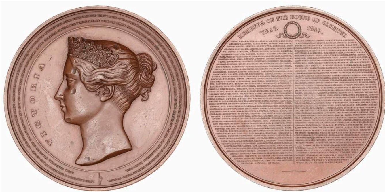
1290 Members of Parliament , 1849, a bronze medal by L.C. Lauer, coroneted bust of Victoria left, names of her ministers around, rev. names of the members, 95mm (BHM 2351; E 1439). A few obverse surface marks, otherwise nearly extremely fine; in contemporary case £300-£400