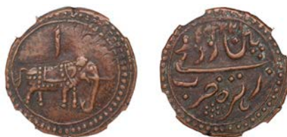
1090 MYSORE, Tipu Sultan , Paisa, Patan, AM1224 [1796-7] (Henderson 133; KM 123.6). Good very fine [certified and graded by NGC as AU 55 BN] £240-£300