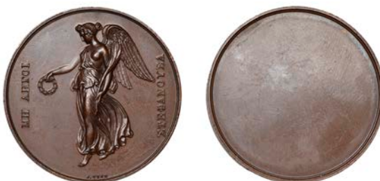
1234 Unidentified , a specimen bronze medal by B. Wyon, ΜΗ ΑΓΓΟΙ ΣΤΕΦΑΝΟΥΣΑ, winged Nike holding wreath and palm, rev. blank, edge stamped '54', 34mm. Extremely fine £80-£100