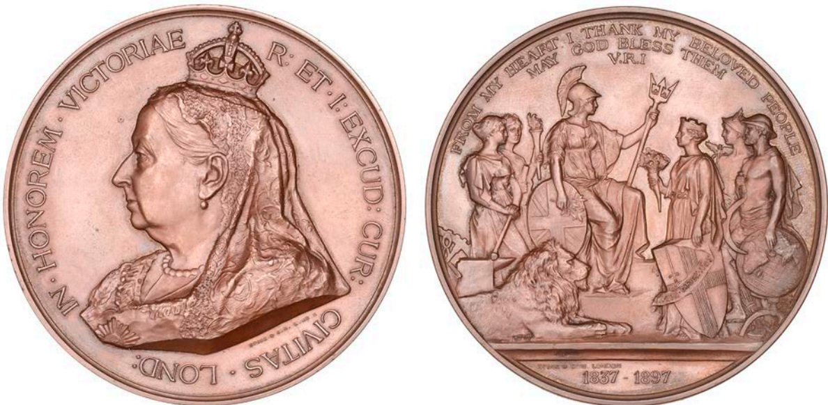
1215 Victoria, Diamond Jubilee , 1897, a bronze medal by F. Bowcher for Spink, for the Corporation of the City of London, bust left, rev. Londinia with attendants presenting garland to seated Britannia, 76mm (W & E 3470A.1; BHM 3510; E 1815). Extremely fine; in original fitted gilt-blocked case of issue £300-£400

Provenance: A Collection of City of London Medals, the Property of a Gentleman, DNW Auction 138, 12 December 2016, lot 2730