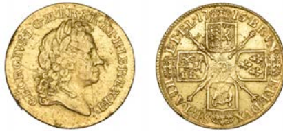
430 Guinea, 1715, third bust (EGC 504; S 3630). Surfaces scuffed, otherwise good fine