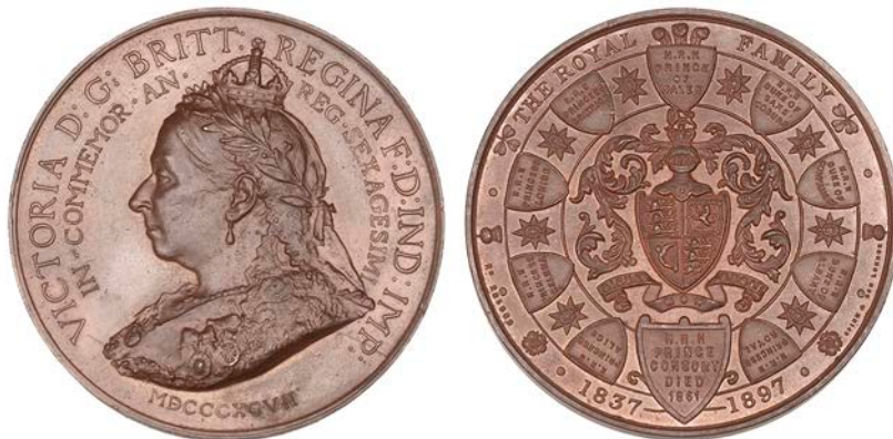
1322 Victoria, Diamond Jubilee , 1897, a bronze medal by F. Bowcher for Spink, crowned laureate bust left, rev. royal arms on shield in centre, smaller shields around bearing names of members of the Royal Family, 51mm (W & E 3476B.3; BHM 3512). Good extremely fine £150-£180