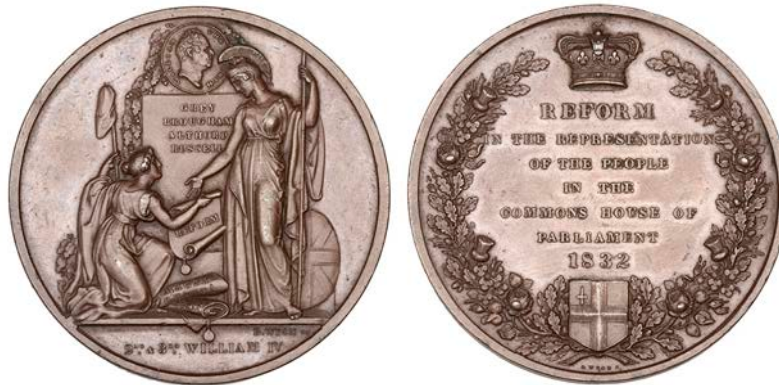
1190 Reform Bill Passed , 1832, a copper medal by B. Wyon for the Corporation of London, crowned legend in wreath, rev. Liberty presents Bill of Reform to Britannia, 51mm (BHM 1603; E 1254). About extremely fine £100-£120