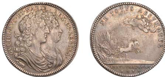
1249 William and Mary, Coronation , 1689, a silver medal, unsigned [by J. Roettiers], conjoined busts right, rev. Jove hurling a thunderbolt at Phæthon who is falling from his chariot, 35mm, 17.10g (MI I, 662/25; E 312). Good very fine, toned £300-£400