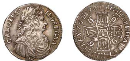
717 Charles II , First coinage, Merck, 1672, leaved thistle below bust, reads DEI ., 6.19g/12h (Murray 19; B 10, fig. 1052; S 5611). Very fine for issue, some toning £300-£360