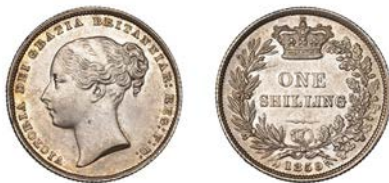
617 Shilling, 1859 (ESC 3015; S 3904). Good extremely fine