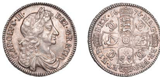
388 Halfcrown, 1676, fourth bust, edge VICESIMO OCTAVO (ESC 471; S 3367). A scattering of light marks, otherwise about extremely fine, attractive light toning