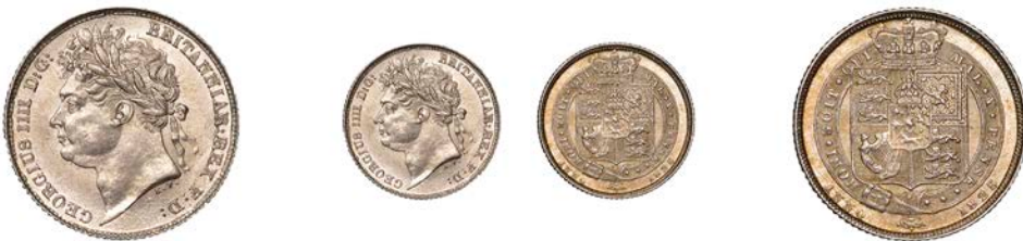
538 Sixpence, 1825 (ESC 2427; S 3814). Extremely fine