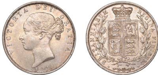
595 Halfcrown, 1883 (ESC 2762; S 3889). Extremely fine, lightly toned