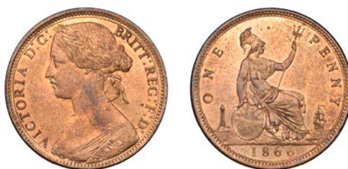
631 Penny, 1866, dies Jg (Gouby A; Bamford 70; F 52; BMC 1670; S 3954). Good extremely fine with much original colour £150-£200