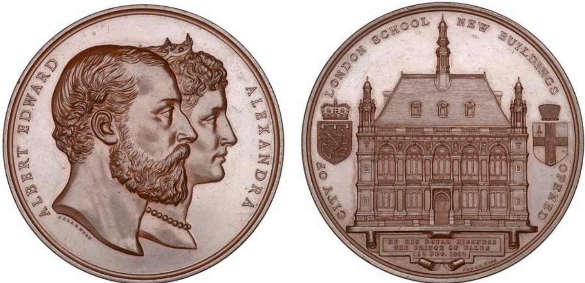
1205 City of London School, New Buildings Opened , 1882, a bronze medal by J.S. & A.B. Wyon for the Corporation of the City of London, conjoined busts of the Prince and Princess of Wales right, rev. frontal elevation of the School, 77mm (W & E 1461A.1; BHM 3133; E 1690; Taylor 202a). Extremely fine or better; in maroon fitted case of issue £300-£400