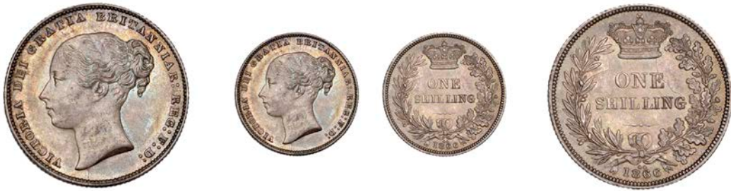
344 Shilling, 1866, die 51 (ESC 3027; S 3905). About as struck, prettily toned