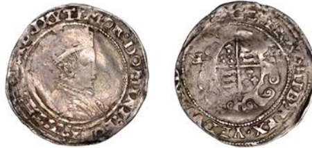
227 Second period, First issue, Shilling, Southwark, mm. Y, transposed legends [reads TIMOR : DOMINI], 3.42g/11h (Bispham p.135; N 1918; S 2465A). Light surface scratches, good fine for issue £300-£360