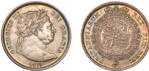
497 Halfcrown, 1817, large head (ESC 2090; S 3788). Extremely fine or better