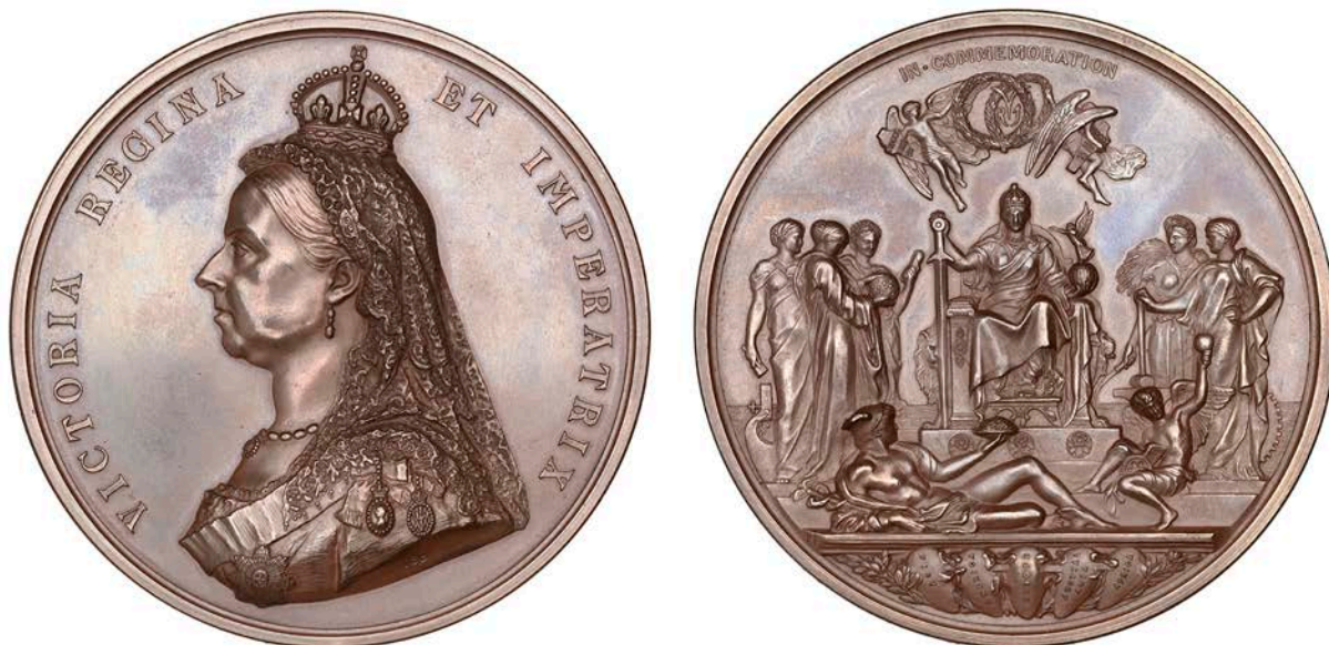
1312 Victoria, Golden Jubilee , 1887, a bronze medal by L.C. Wyon after Sir J.E. Boehm and Sir F. Leighton, crowned bust left, rev. enthroned figure of Empire surrounded by standing figures representing Science, Letters, Art, etc, Mercury and Time below, 77mm (W & E 2000A.1; BHM 3219; E 1733b). Extremely fine £150-£200