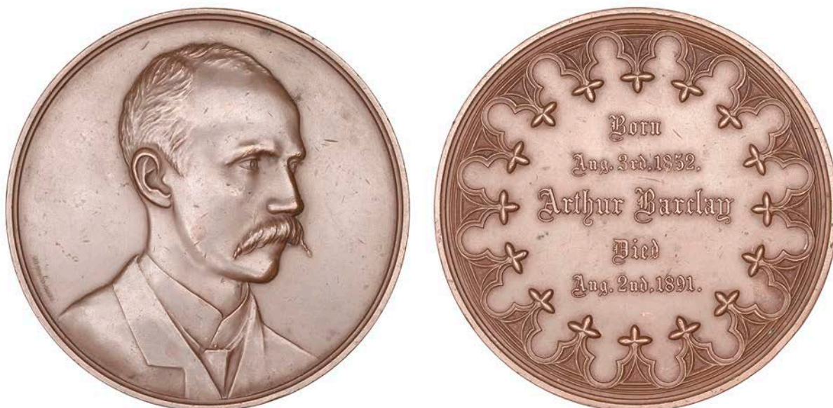
1357 INDIA, Asiatic Society of Bengal, Barclay Medal, 1891 , a bronze award by Devigne-Hart, bust three-quarters right, rev. inscription within ornate Gothic border, edge named (John Stephenson, 1925), 76mm (Pudd. 891.5). Extremely fine and very rare; in fitted case of issue £200-£260