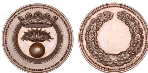
1235 Unidentified , a specimen bronze medal by J.S. Wyon, undated, flaming orb below crown, rev. wreath, edge stamped '80', 38mm. Good extremely fine £80-£100