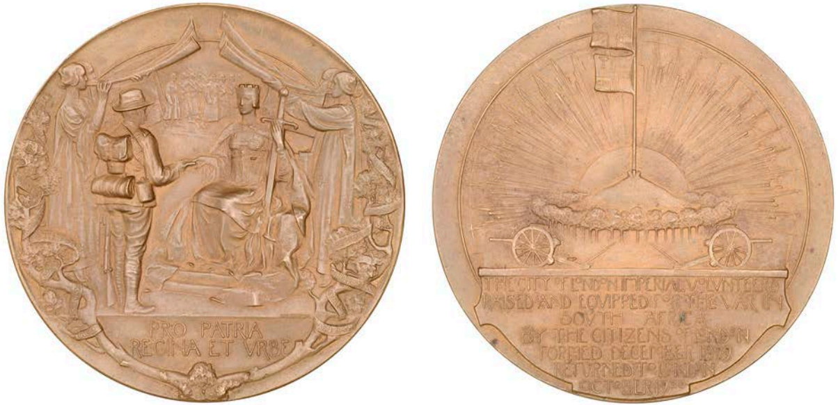
1216 City of London Imperial Volunteers , 1900, a bronze medal by Sir George Frampton for the Corporation of the City of London, Volunteer standing before seated Londinia, rev. flagpole on mound surrounded by ring of trees, radiant sun behind, 76mm (BHM 3684; E 1848). Extremely fine; in case of issue [this in unusually good condition] £150-£200