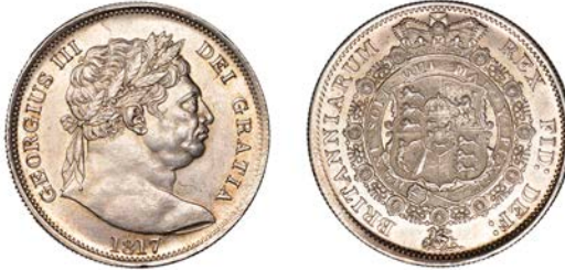
496 Halfcrown, 1817, large head (ESC 2090; S 3788). Good extremely fine