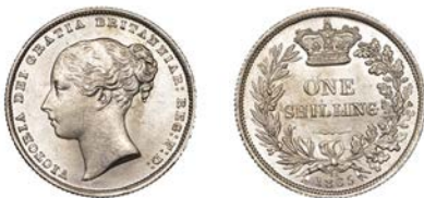
618 Shilling, 1865, die 28 (ESC 3025; S 3905). Virtually as struck