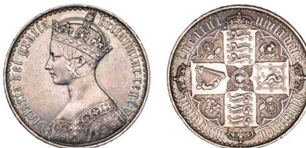
573 'Gothic' Crown, 1847, edge UNDECIMO (ESC 2571; S 3883). Edge nick at 12 o'clock, small reverse edge bruise, otherwise very fine, reverse a little better, toned