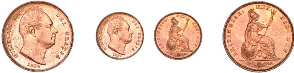
560 Farthing, 1834, rev. B (BMC 1471; S 3848). About as struck with full original colour