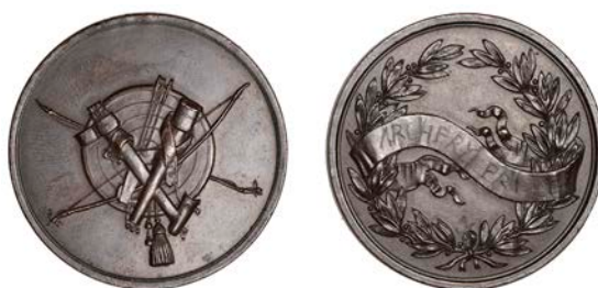
1233 Archery , a specimen bronze medal, unsigned and undated, crossed quivers and bows, target behind, rev. ribbon on wreath, ARCHERY PRIZE hand-engraved on ribbon, edge stamped '340', 34mm. Extremely fine £60-£80