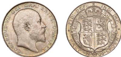
649 Halfcrown, 1906 (ESC 3572; S 3980). Better than extremely fine