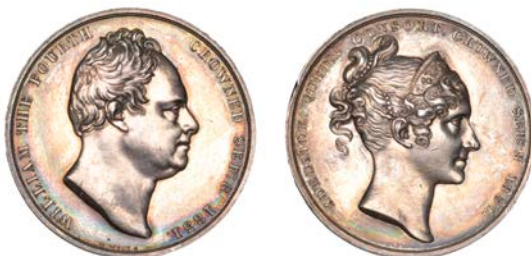
1277 William IV, Coronation , 1831, a silver medal by W. Wyon, bust right, rev. bust of Queen Adelaide right, 33mm, 18.16g (BHM 1475; E 1251). Brushed, otherwise about extremely fine £200-£260