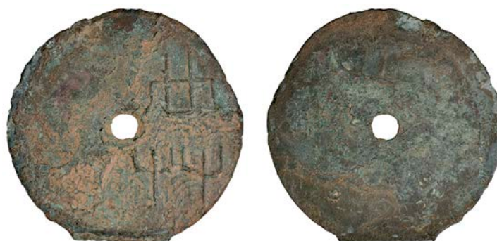
1059 WARRING STATES, Zhou Dynasty , round cash (c. 350-220 BC), Gong, 45mm, 8.66g (H 6.1). Fine, very rare