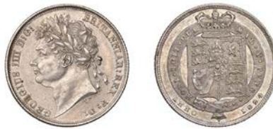
528 Shilling, 1824 (ESC 2400; S 3811). About extremely fine, toned