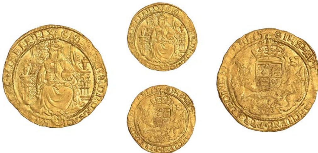
220 Third coinage, Half-Sovereign, Tower, mm. pellet-in-annulet, Roman lettering both sides, trefoil stops, 6.19g/7h (SCBI Schneider 612ff; N 1827; S 2294). Trace of a crease and a scattering of light marks, otherwise better than very fine, struck on a full flan £2,000-£2,600

Provenance: found near Owermoigne (Dorset) in September 2016 (PAS SUSS-8D9CDB)