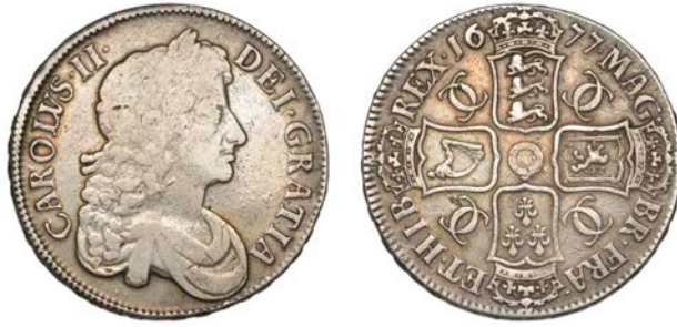
385 Crown, 1677, third bust, edge VICESIMO NONO (ESC 398; S 3358). Fine