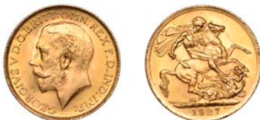
G 1141 George V , Sovereign, 1927 SA (M 291; S 4004). Extremely fine £300-£400