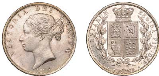
597 Halfcrown, 1886 (ESC 2767; S 3889). Extremely fine or better