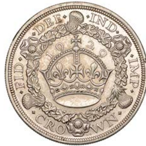
663 Crown, 1929 (ESC 3636; S 4036). Nearly extremely fine