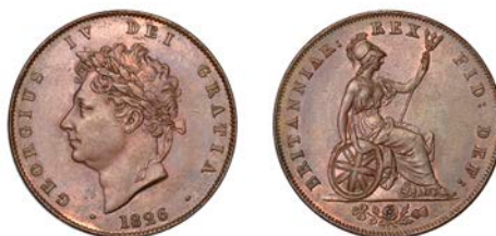
541 Halfpenny, 1826, rev. A (BMC 1433; S 3824). Extremely fine, some original colour