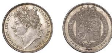
530 Shilling, 1825, type 2 (ESC 2402; S 3811). Extremely fine, light grey tone