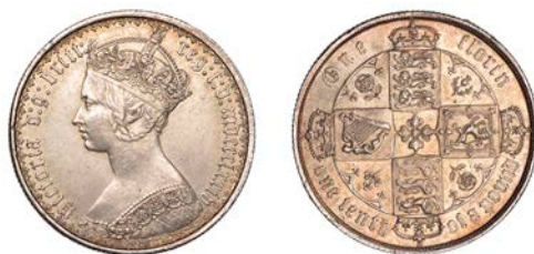
606 Florin, 1874, die 45 (ESC 2881; S 3893). Nearly extremely fine