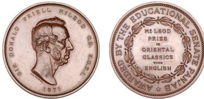
1238 INDIA, Punjab Education Senate , 1871, McLeod Medal, a specimen bronze award by A.B. Wyon, bare head of Sir Donald McLeod right, rev. legend within wreath, edge stamped '308', 42mm (Pudd. 871.1.1). Good extremely fine, rare £300-£400