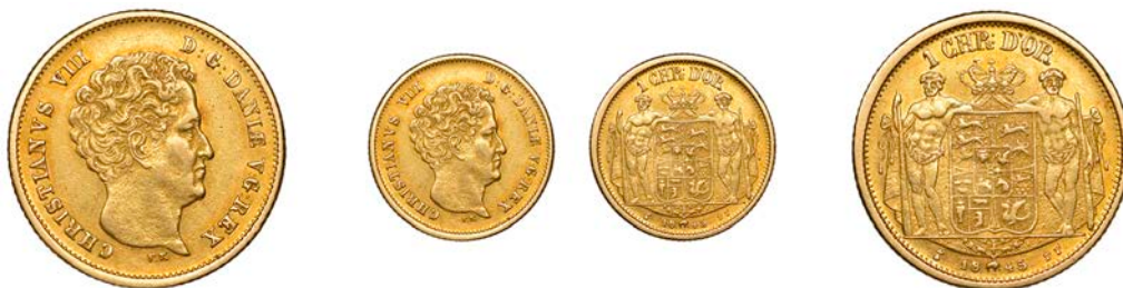
G 1069 Christian VIII , Christian d'or, 1845 FF , Altona, 6.61g/12h (Hede 2; KM 730; F 290). Very fine, rare £2,400-£3,000