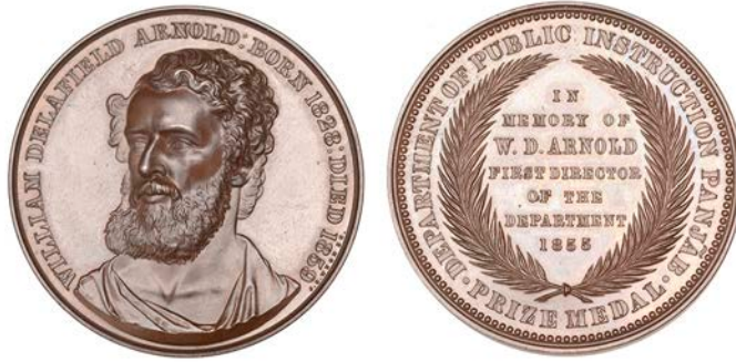
1237 INDIA, Punjab Department of Public Instruction , 1859, Arnold Medal, a specimen bronze award by J.S. Wyon, bust of William Arnold facing, rev. legend within wreath, edge stamped '558', 42mm (Pudd. 859.1; BHM 2648). Good extremely fine, very rare £300-£400