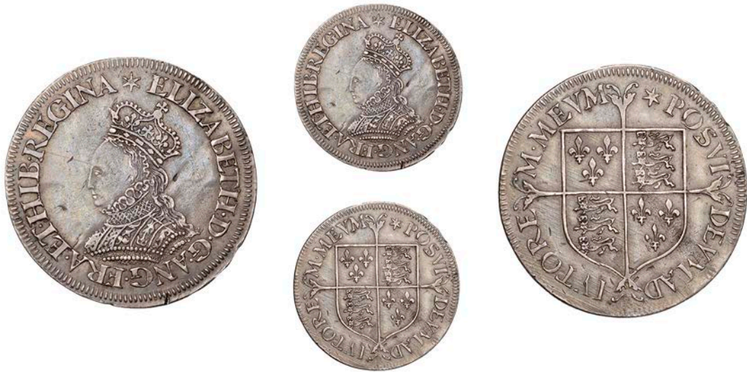
254 Milled coinage, Shilling, large size, mm. star, bust A, decorated dress, 5.95g/6h (Borden & Brown 15 [O2/R2]; N 2023; S 2590). Small edge cut, edge partly filed, some digs in flan, otherwise good very fine and toned, scarce Provenance: H.J. Hoby Collection, Spink Auction 84, 21 May 1991, lot 295