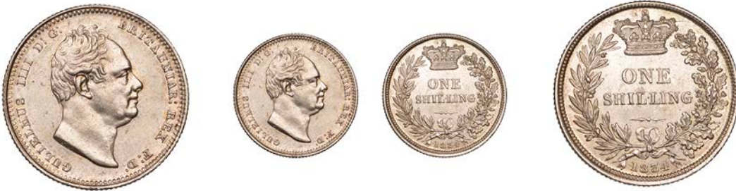
341 Shilling, 1834 (ESC 2489; S 3835). Extremely fine, wiped on obverse