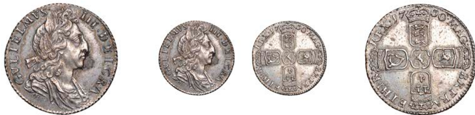
416 Sixpence, 1700, third bust (ESC 1250; S 3538). Small stain in obverse field, otherwise good extremely fine, toned