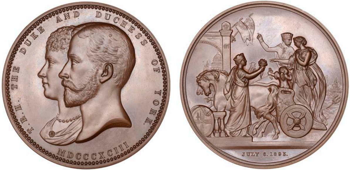
1212 Visit of the Duke and Duchess of York to the City of London , 1893, a bronze medal by G.G. Adams for the Corporation of the City of London, conjoined busts left, rev. Duke and Duchess in biga driven by Cupid, being presented with a cornucopia by Londinia, 76mm (W & E 1763A.1; BHM 3452; E 1780). Extremely fine or better; in fitted case of issue £300-£400