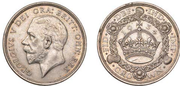
671 Crown, 1934 (ESC 3647; S 4036). A few small reverse rim nicks, good very fine, rare