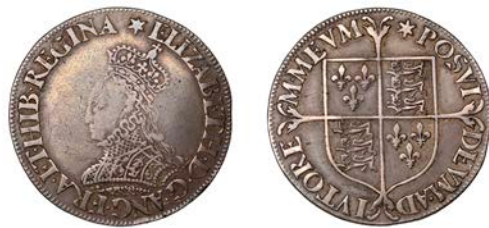
255 Milled coinage, Shilling, intermediate size, mm. star, 6.01g/6h (Borden & Brown 16 [O1/R2]; N 2023; S 2591). About very fine, toned