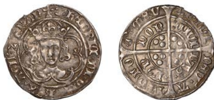
205 Facing Bust issue, Groat, class IIIc, mm. upright anchor, crown with inner arch plain, double saltire stops before CIV , single saltire stop after TAS and before LON , 2.85g/12h (SCBI Ashmolean 377; N 1705c; S 2199). Edge ragged at 11 o'clock, otherwise very fine £200-£260