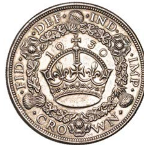
665 Crown, 1930 (ESC 3638; S 4036). Sometime cleaned, very fine