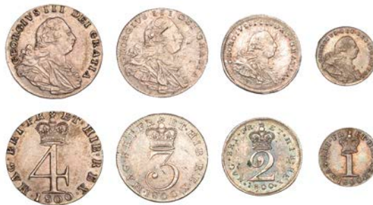
x 461 Maundy set, 1800 (ESC 2239; S 3764) [4]. Twopence scraped in obverse field, otherwise extremely fine