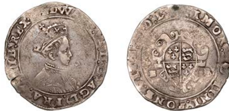
229 Second period, 6 oz. issue, Shilling, MDL, Southwark, mm. obscured [probably Y], bust 5, 4.91g/1h (N 1919/2; S 2466B). Peripheral striking weakness, otherwise very fine for issue with an excellent portrait £600-£800

Struck from the same reverse die as the Shuttlewood coin (245).