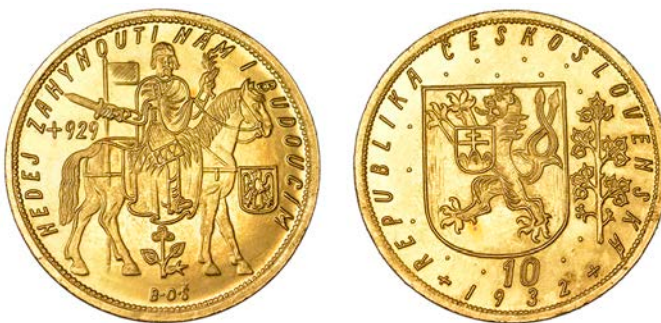
G 1063 Republic, 10 Ducats, 1932 (KM 14; F 4). Good extremely fine