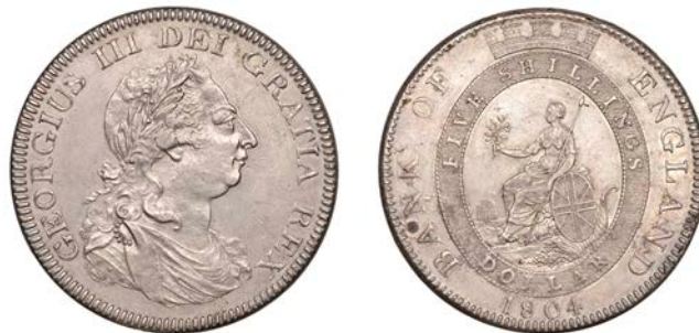
479 Dollar, 1804, types E/2 (ESC 1951; S 3768). Lightly cleaned, about extremely fine £200-£260