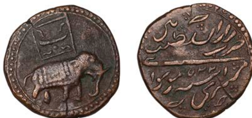
A Small Group of Copper Coins of Tipu Sultan