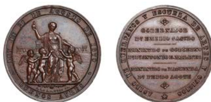
1236 ARGENTINA, Orphanage and School of Arts and Crafts, Buenos Aires , 1870, a specimen bronze medal by J.S. & A.B. Wyon, standing female figure surrounded by three winged cherubs, rev. legend, edge stamped '271', 26mm. Extremely fine, rare £100-£120