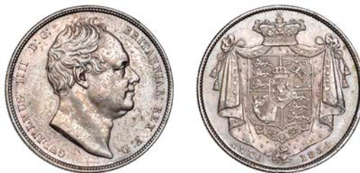
546 Halfcrown, 1834, w.w. in script (ESC 2478; S 3834). Light hairlines and marks, about extremely fine and toned