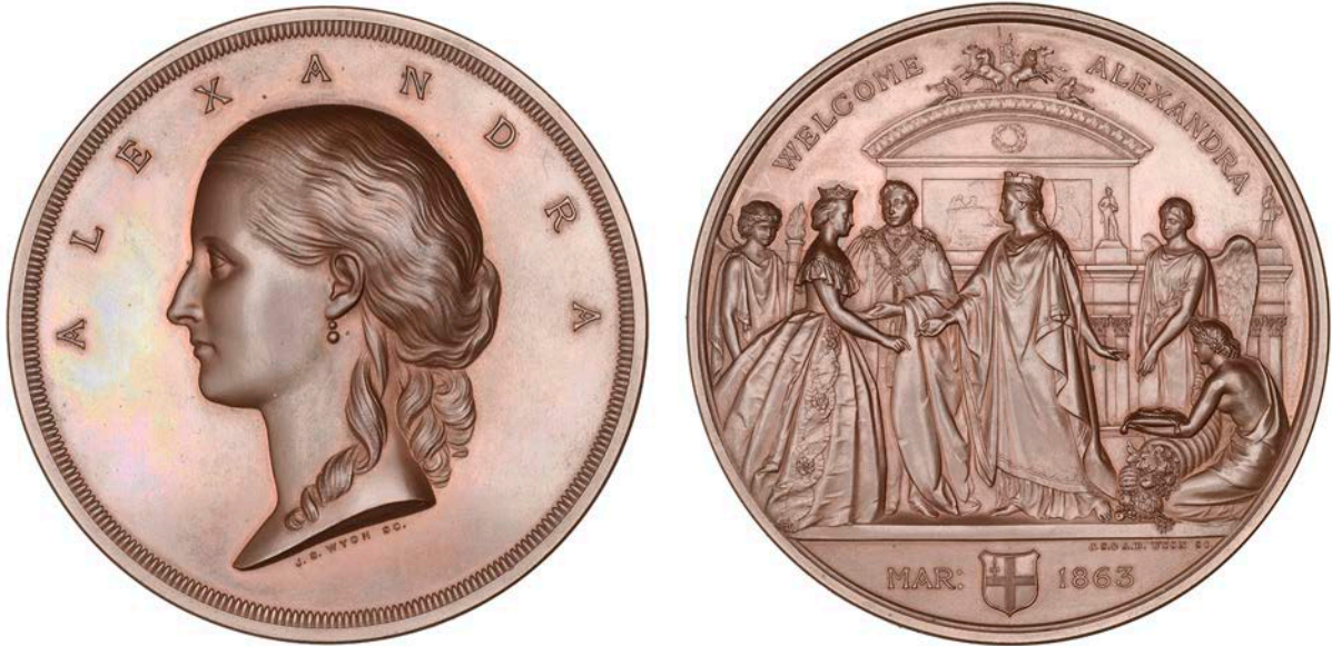
1196 Entry of Princess Alexandra into the City of London , 1863, a copper medal by J.S. & A.B. Wyon, bare head left, rev. Londinia welcoming the Prince of Wales and Princess Alexandra, 77mm (W & E 901A.1; BHM 2783; E 1561). Extremely fine or better; housed in maroon fitted case of issue £400-£500