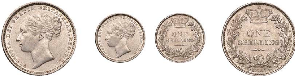
346 Shilling, 1883 (ESC 3072; S 3907). Light marks, extremely fine or better