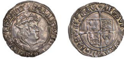
215 Second coinage, Groat, Tower, mm. arrow, bust D, saltires in forks, 2.65g/3h (N 1797; S 2337E). Minor striking split and some double-striking in legends, otherwise very fine and toned £240-£300