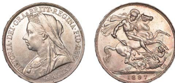
580 Crown, 1897, edge LXI (ESC 2603; S 3937). A little scuffed, light surface marks, lightly cleaned at some time, otherwise extremely fine or better £200-£300