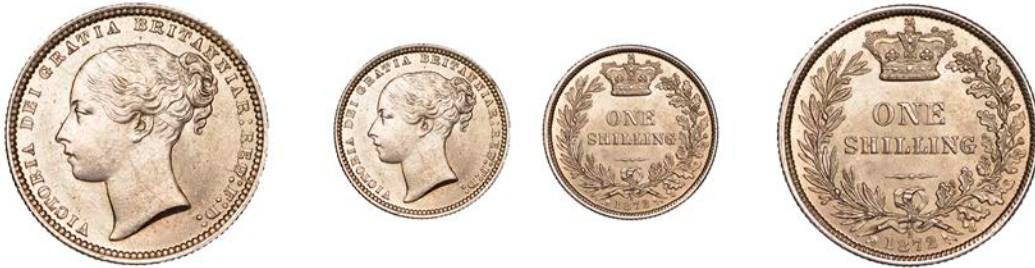
345 Shilling, 1872, die 2 (ESC 3042; S 3906A). About as struck