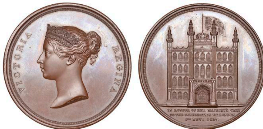
1192 Victoria, Visit to the Guildhall , 1837, a copper medal by W. Wyon for the Corporation of London, diademed bust left, rev. façade of the Guildhall, 55mm (W & E 72; BHM 1775; E 1304). Extremely fine or better; housed in later case £300-£400