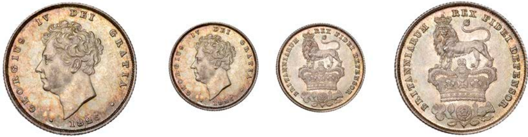
340 Shilling, 1826 (ESC 2409; S 3812). Good extremely fine, lightly toned over residual lustre