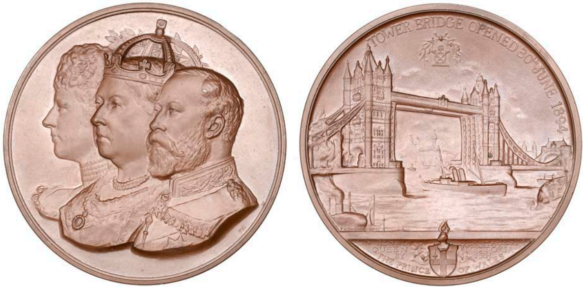
1214 Opening of Tower Bridge , 1894, a bronze medal by F. Bowcher, conjoined busts of Victoria, the Prince and Princess of Wales left, rev. view of the bridge, the Royal Yacht, HMY Victoria and Albert , passing underneath, 76mm (W & E 1795.1; BHM 3476; E 1790; Taylor 225a). Extremely fine; in fitted case of issue [this slightly scuffed] £300-£400