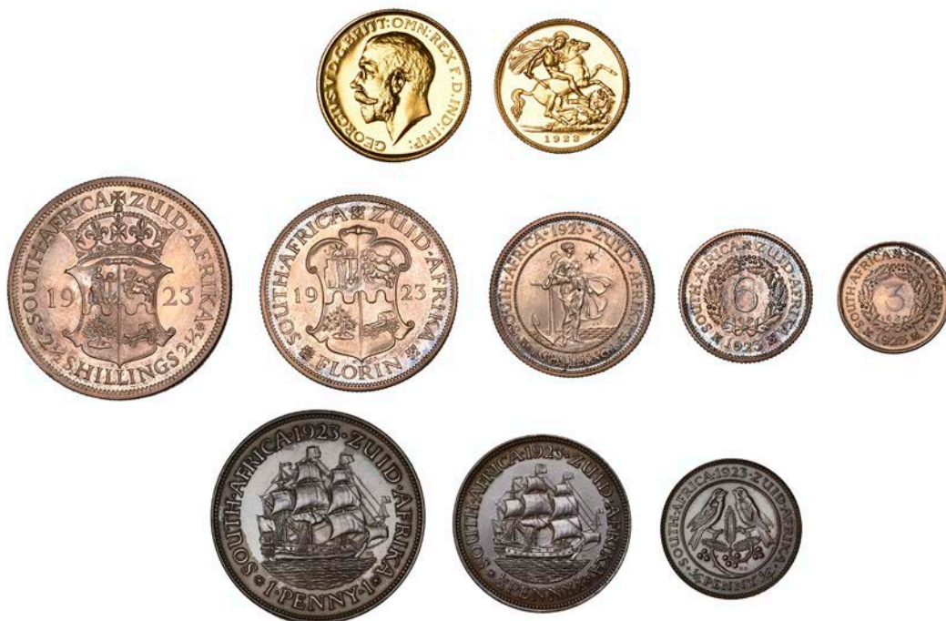
1143 George V , Proof set, 1923, comprising Sovereign, Half-Sovereign, Halfcrown, Florin, Shilling, Sixpence, Threepence, Penny, Halfpenny and Farthing (Hern P2; KM PS1) [10]. About as struck, brilliant, the silver lightly toned, the bronze with dark patina; in original Mappin & Webb fitted case £2,000-£2,600