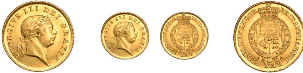
G 457 Half-Guinea, 1804, seventh bust (EGC 849; S 3737). Extremely fine