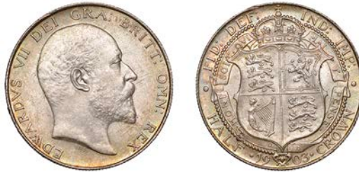
645 Halfcrown, 1903 (ESC 3569; S 3980). Extremely fine or better, reverse lightly toned, rare thus