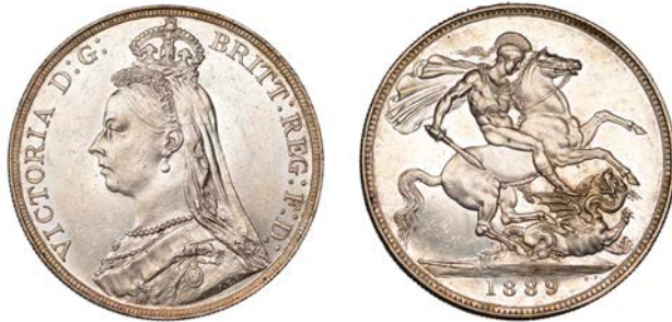
576 Crown, 1889 (ESC 2589; S 3921). Small scuff before face, extremely fine or better £150-£200