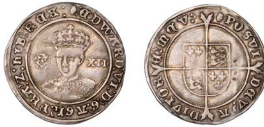
237 Third period, Fine issue, Shilling, mm. tun, caul frosted, 5.86g/3h (N 1937; S 2482). Good fine, toned