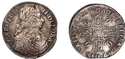
716 Charles II , First coinage, Merck, 1669, leaved thistle below bust, no stops on obv. , 5.89g/12h (B –; S 5611). Light surface porosity, good fine, the obverse error very rare £200-£260