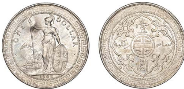
1055 Trade Dollar, 1908 B (Prid. 18; KM T5). About extremely fine