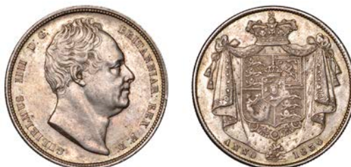
548 Halfcrown, 1836 (ESC 2482; S 3834). Good very fine