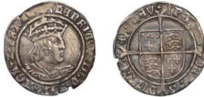
216 Second coinage, Groat, Tower, mm. arrow, bust D, 2.61g/10h (N 1797; S 2337E). Small edge chip and edge crack, otherwise very fine £150-£180