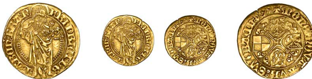
1077 BRANDENBURG-FRANKEN, Friedrich , Goldgulden, 1499, Schwabach, 3.26g/12h (Levinson I-401; S-J 1204; F 306). Very fine £600-£800