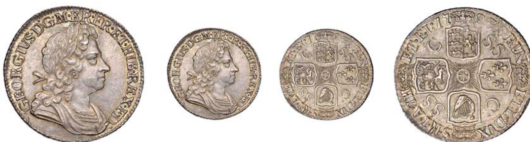
325 Shilling, 1723 ss c, first bust, c over ss in fourth quarter (ESC 1590; S 3647). About as struck, prettily toned with peripheral iridescence; the error rare