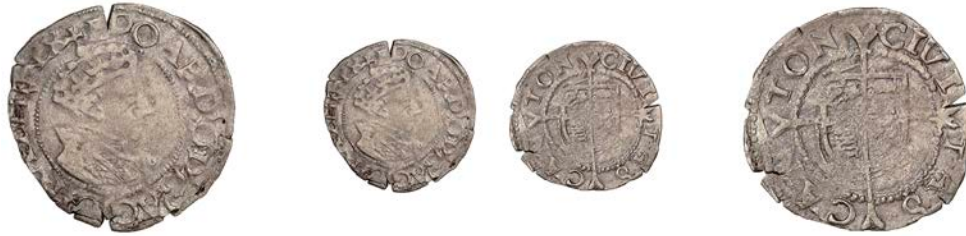
226 First period, Halfgroat, Canterbury, no mm., reads EDOARD, 1.17g/9h (N 1901; S 2459). Fine for issue, perhaps waterworn, very rare £400-£500