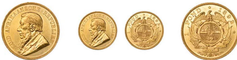
G 1136 Paul Kruger, Pond, 1892, double shaft (Hern Z44; KM 10.1; F 2). Virtually mint state