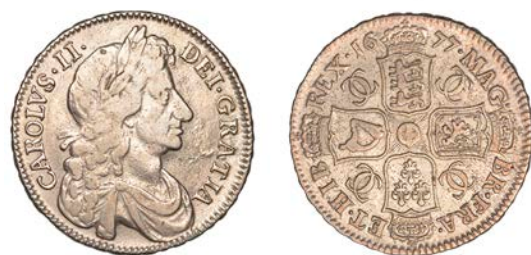
389 Halfcrown, 1677, fourth bust, edge VICESIMO NONO (ESC 475; S 3367). Cleaned bright, good fine

Provenance: Glendining Auction, 16 June 1971, lot 175 (part); H. Manville Collection, Spink Auction 9, 4 June 1980, lot 39