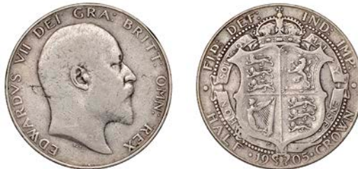
648 Halfcrown, 1905 (ESC 3571; S 3980). Fair to fine, rare