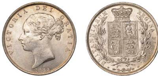
596 Halfcrown, 1885 (ESC 2765; S 3889). Minor obverse bagmarks, otherwise about as struck