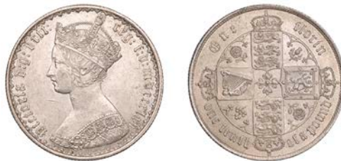
605 Florin, 1865, die 27 (ESC 2857; S 3892). Mark below chin, otherwise extremely fine