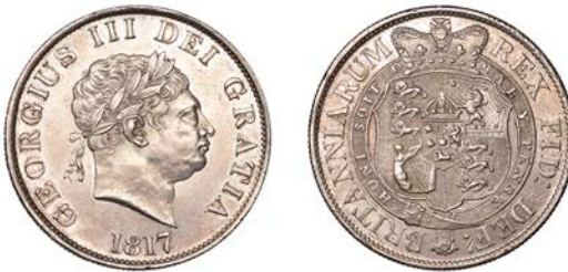
498 Halfcrown, 1817, small head (ESC 2096; S 3789). Of bright appearance, extremely fine