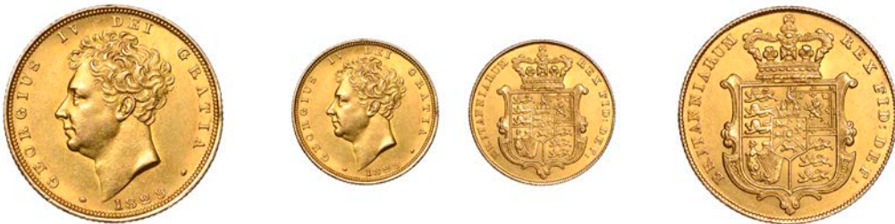
G 514 Sovereign, 1829 (M 14; S 3801). About extremely fine