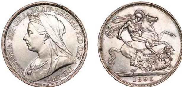
578 Crown, 1893, edge LVI (ESC 2593; S 3937). Raised rim flaw at 1 o'clock on obverse, otherwise good extremely fine, the fields prooflike £150-£200