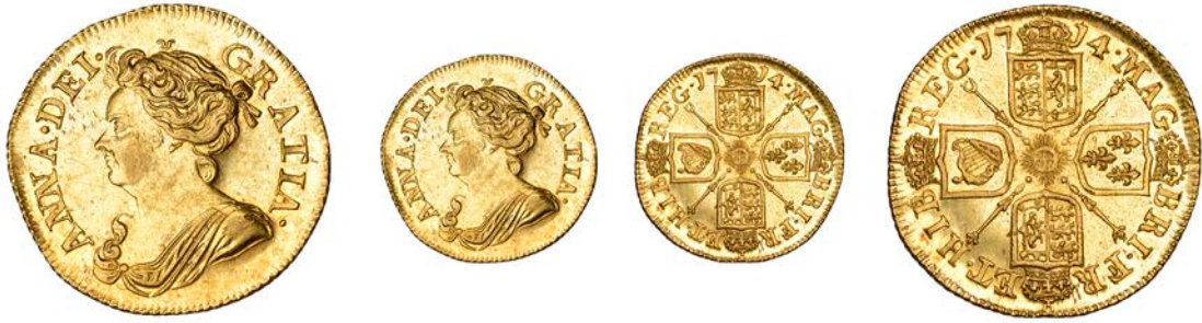
418 Guinea, 1714, third bust (EGC 479; S 3574). Light scratches in obverse field, otherwise extremely fine, reverse better, mint bloom £3,000-£4,000