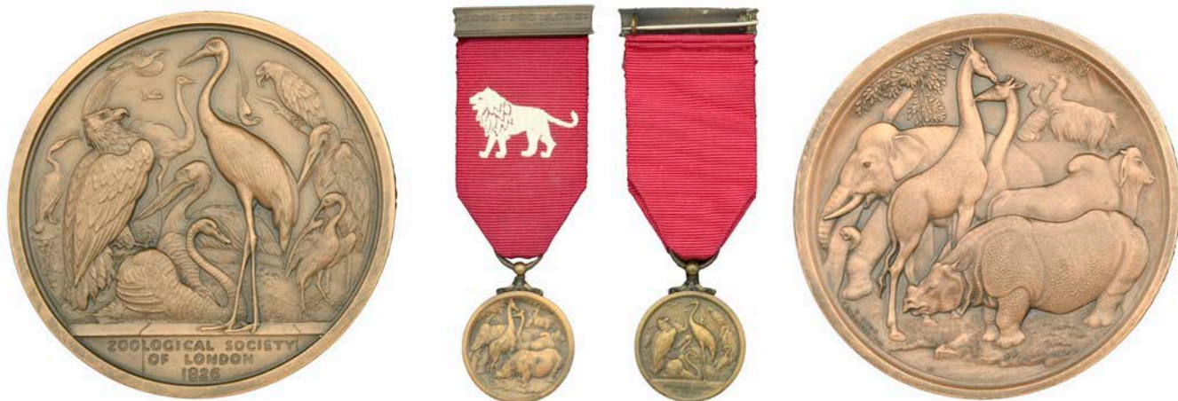
1274 Zoological Society of London , 1826, a light bronze award medal by B. Wyon after T. Landseer, exotic birds, rev. African and Asian animals beneath tree, edge named (T. Law for Long and Meritorious Service 1981), 77mm (BHM 1272; E 1187); a small dress medal, similar, 27mm; sold together with a World War I Defence and Victory medal to the same recipient (439220 Pte T. Law 52 Can Inf) [4]. Extremely fine, second with suspension loop, ribbon and bar, very rare; first two in original Royal Mint cases of issue £1,000-£1,200