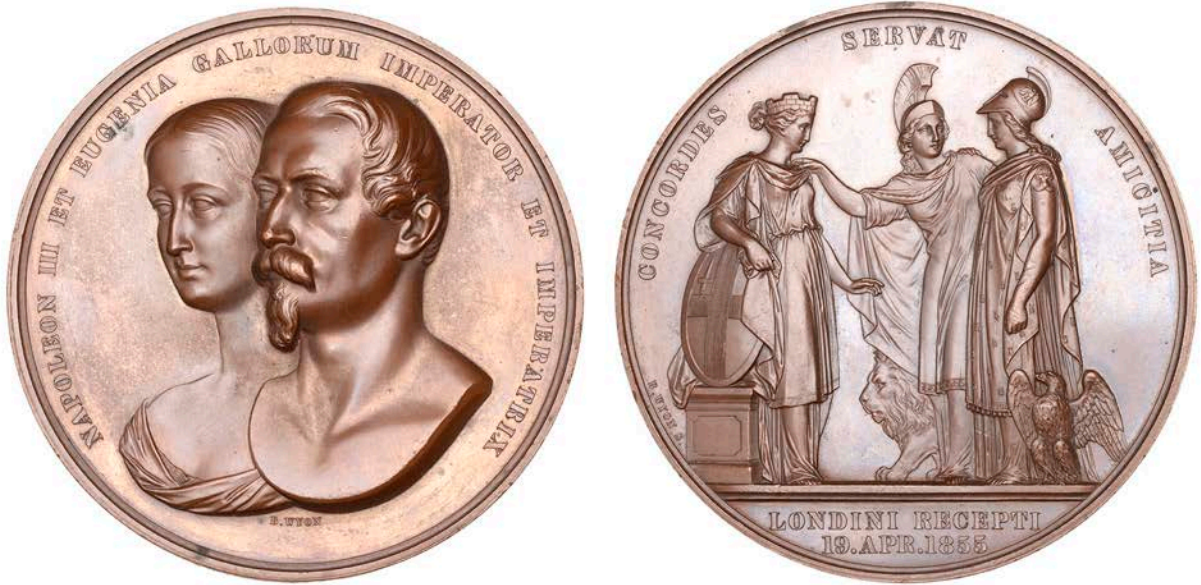
1194 Visit of Napoleon III to London. 1855, a copper medal by B. Wyon for the Corporation of the City of London, conjoined busts of Napoleon III and Eugenie facing three-quarters left, rev. Britannia introduces France to Londinia, 76mm (Page-Divo 233; BHM 2561; E 1496). Extremely fine; in modern round fitted case £200-£300

Provenance: A Collection of City of London Medals, the Property of a Gentleman, DNW Auction 138, 12 December 2016, lot 2711