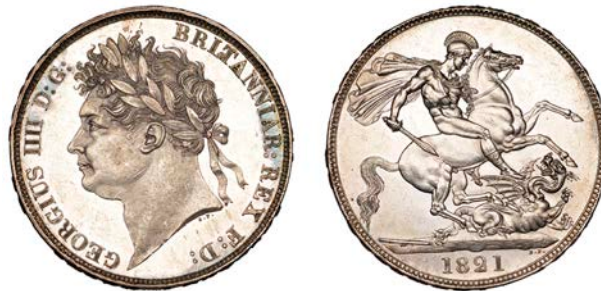
515 Crown, 1821, edge SECUNDO (ESC 2310; S 3805). Better than extremely fine, obverse prooflike but with numerous surface marks