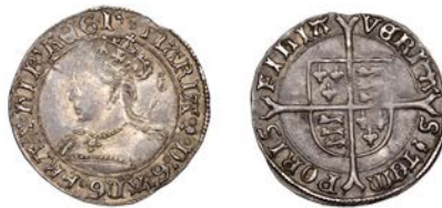
240 Groat, mm. pomegranate, MARIA D' G' ANG' FRA' Z HIB' REGI, 1.98g/1h (N 1960; S 2492). A little striking weakness, otherwise good very fine, prettily toned