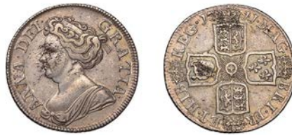
427 Shilling, 1711, fourth bust (ESC 1408; S 3618). Some haymarking, particularly on queen's face, very fine