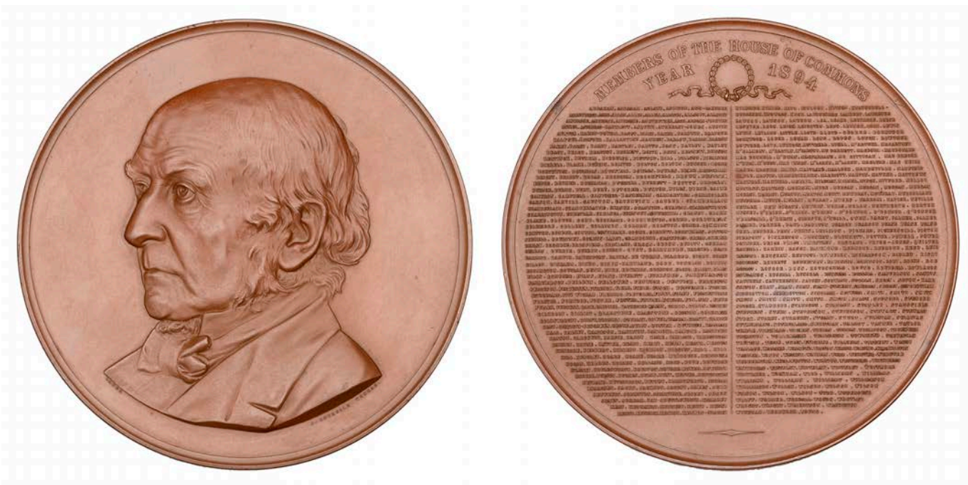
1319 Resignation of William Gladstone as Prime Minister , 1894, a large light bronze medal by L.C. Lauer for J. Rochelle Thomas, bust left, rev. inscription recording the names of all members of the House of Commons, 95mm (BHM 3468; E 1792). Extremely fine £150-£200