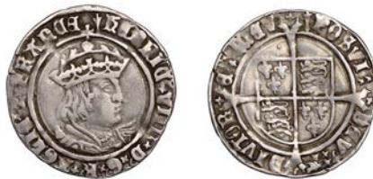
217 Second coinage, Groat, Tower, mm. arrow, bust D, saltires in forks, 2.69g/4h (N 1797; S 2337E). Good fine, clear portrait, toned £120-£150