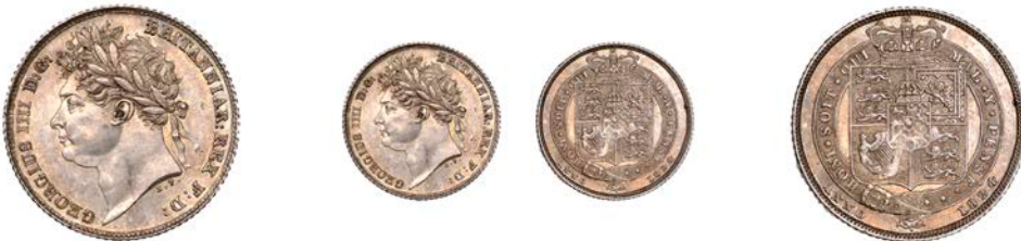
536 Sixpence, 1824 (ESC 2425; S 3814). Extremely fine and toned