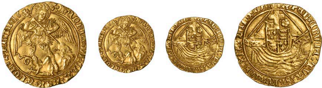
203 Angel, type III, mm. pansy, saltire stops on both sides, 5.09g/9h (SCBI Ashmolean 21; N 1696; S 2183). Discrete edge mark, otherwise good very fine, with a clear portrait of St Michael £2,000-£2,600