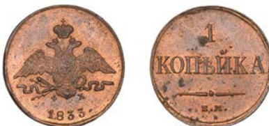
1130 Nicholas I , Kopeck, 1833Фх, Ekaterinburg, 4.77g/12h (Bit. 520; Brekke 84). Minor spotting on reverse, otherwise extremely fine with original colour £100-£120 Provenance: D.L.F. Sealy Collection