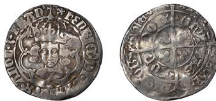
204 Facing bust issue, Groat, class IIIa/II mule, mm. cinquefoil, 2.92g/12h (SCBI Ashmolean 230; N 1705a/1704; S 2198/2195). Fine, rare £150-£180