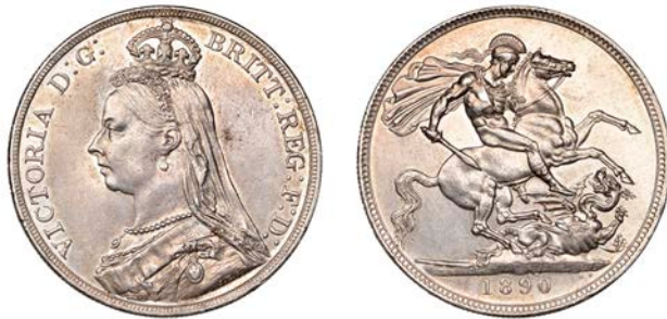
577 Crown, 1890 (ESC 2590; S 3921). Nearly extremely fine £120-£150