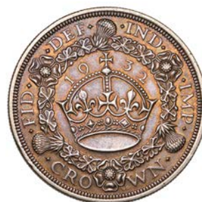
667 Crown, 1932 (ESC 3641; S 4036). Cleaned, good very fine, toned