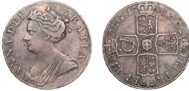
423 Crown, 1708E, edge SEPTIMO (ESC 1356; S 3600). Very fine, toned