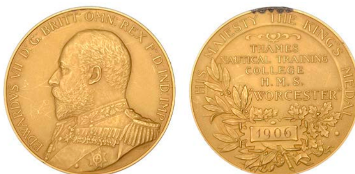
1333 HMS Worcester , The King's Medal, a gold award by G.W. de Saullès, uniformed bust of Edward VII left, rev. tablet dated '1906', crossed laurel and oak branches behind, edge named (James Alexander Blackburn), 45mm, 56.24g (BHM 3708). Some light scratches, traces of solder on edge, otherwise extremely fine, very rare; in case of issue [this damaged] £2,000-£2,600

Provenance: Münzen Gut-Lynt Auction 6, 19 June 2022, lot 1005