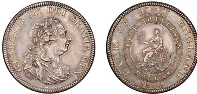
473 Dollar , 1804, types A/2 (ESC 1925; S 3768). Cleaned at one time and now re-toned, otherwise good very fine £300-£400