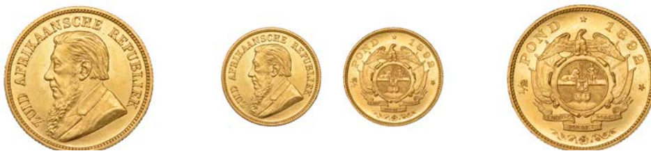
G 1137 Paul Kruger, Half-Pond, 1892, double shaft (Hern Z38; KM 9.1, F 3). Virtually mint state