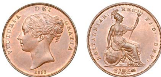
628 Penny, 1853, far colon (BMC 1500; S 3948). About mint state, much original colour £160-£180