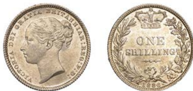
623 Shilling, 1886 (ESC 3078; S 3907). About as struck