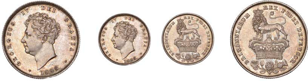
339 Shilling, 1825, type 3 (ESC 2405; S 3812). Trifling marks, otherwise better than extremely fine, prettily toned across bright fields