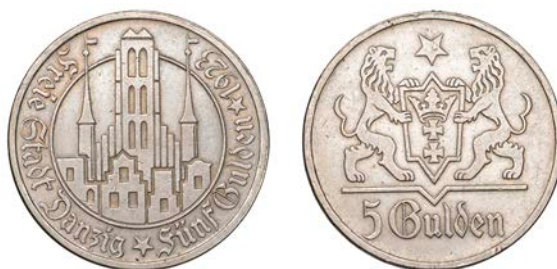
1065 Free City, 5 Gulden, 1923 (Kop. 7845; KM 147). Very fine