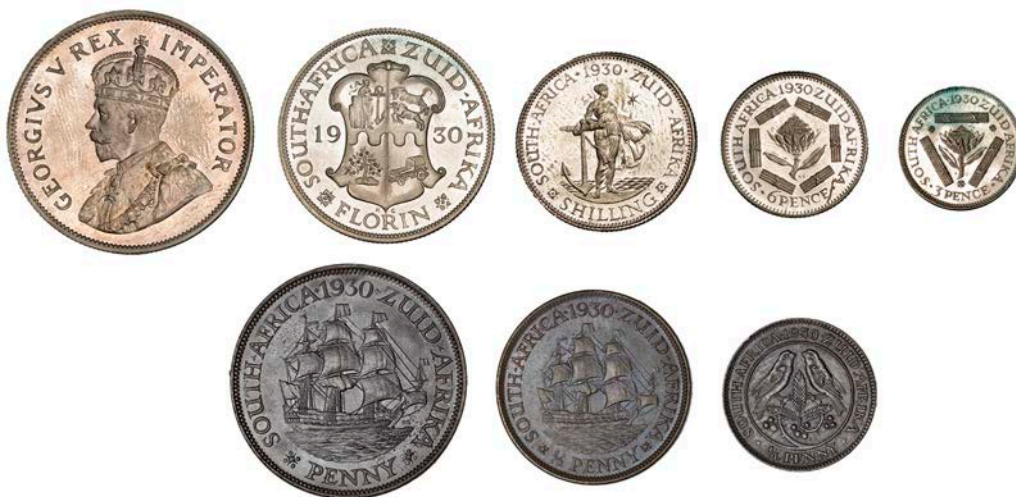
1144 George V , Proof set, 1930, comprising Halfcrown, Florin, Shilling, Sixpence, Threepence, Penny, Halfpenny and Farthing (Hern P6; KM PS5) [8]. Virtually mint state, very rare; in card case of issue £15,000-£20,000