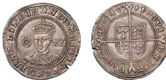
235 Third period, Fine issue, Shilling, mm. tun, 6.27g/11h (N 1937; S 2482). Small scratch in obverse field, otherwise better than very fine and toned; clear portrait of the the young king £500-£600