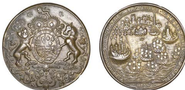
1257 Capture of Portobello , 1739, a pinchbeck medal signed I.W., crowned arms with supporters, rev. six ships outside Portobello harbour, 39mm (Adams PB 2-D; Betts 271; MI II, 539/125; E 549). Good very fine £200-£260