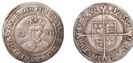
236 Third period, Fine issue, Shilling, mm. tun, caul frosted, 6.16g/10h (N 1937; S 2482). Sometime cleaned, nearly very fine £300-£360