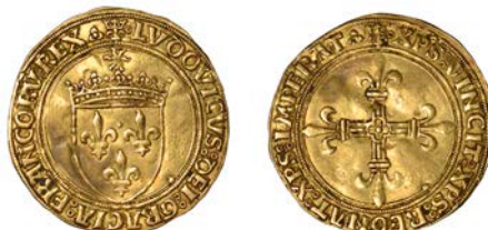
1072 Louis XII , Écu d'or au soleil, Lyon, 3.42g/4h (Dup. 647; Gad. 161; F 323). Very fine £400-£500