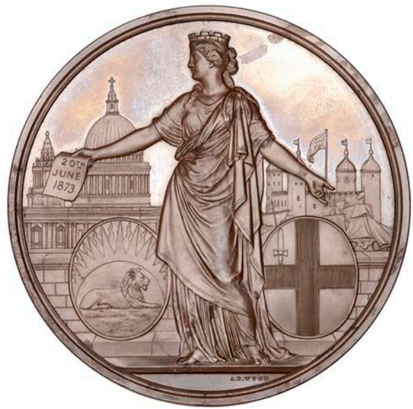
1200 Visit of the Shah of Persia to the City of London , 1873, a bronze medal by A.B. Wyon for the Corporation of the City of London, bust of Nasir al-din three-quarters left, rev. Londinia standing between shields of London and Persia, St Paul's and Tower behind, 77mm (W & E 1202A.1; BHM 2951; E 1623). Extremely fine or better; in fitted case of issue by Wyon, 287 Regent Street, London [this a little faded] £1,200-£1,500

A magnificent entertainment was given for the Shah on Friday 20 June, 1873. While he was probably accustomed to the opulence and splendour of the occasion, the journey to the Guildhall obviously left an impression on him. His diary reveals "We are invited this evening to the house of the Lord Mayor... At night therefore we mounted our carriage and drove off. From our palace to the Lord Mayor's house was quite a league... Every street is lighted with gas, and besides this, electric lights from the roofs and windows of the houses made the streets as clear as the day." There may be a little poetic licence in this description, as an evening reception held close to Midsummer's day would not begin after dark. Likely the description is based on his return journey.