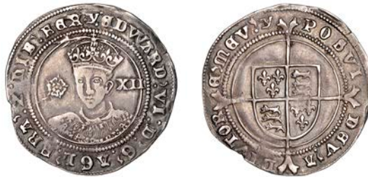
234 Third period, Fine issue, Shilling, mm. Y, early 'emaciated' bust, 6.27g/9h (N 1937; S 2482). Small graffiti in reverse field, about very fine; a scarcer variety £240-£300