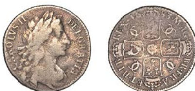
390 Shilling, 1683, fourth bust, seven strings to harp (ESC 558 var.; S 3381). About fine, surface scratches, the variety unrecorded in the standard reverences