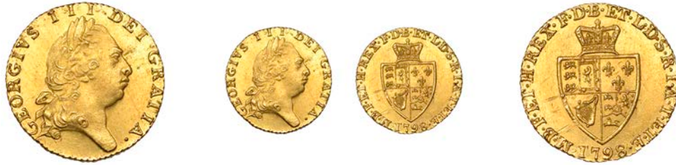
456 Half-Guinea, 1798, fifth bust (EGC 842; S 3735). Small scuff on reverse, otherwise extremely fine, bright fields