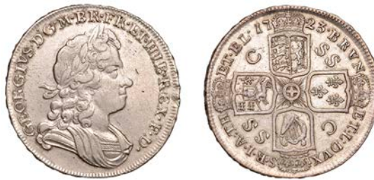
432 Halfcrown, 1723 ss c, edge DECIMO (ESC 1557; S 3643). Light marks, nearly very fine