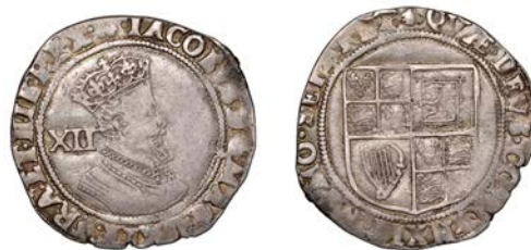
281 Second coinage, Shilling, mm. escallop, fourth bust, 5.86g/2h (N 2100; S 2655). Good fine, surface marks