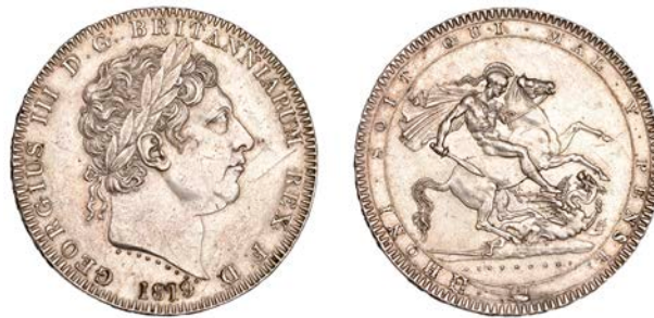
492 Crown, 1819, edge Lx (ESC 2010; S 3787). Better than very fine