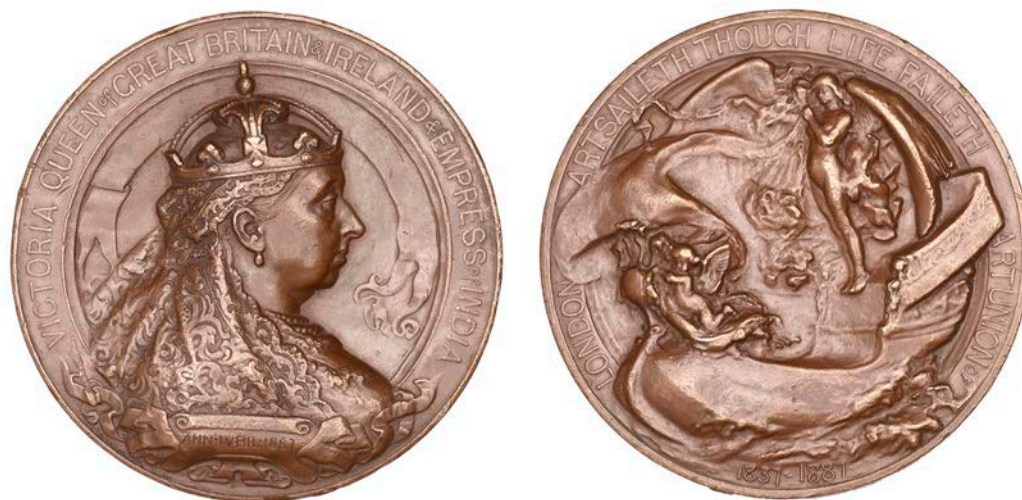
1314 Victoria, Golden Jubilee , 1887, a bronze medal, unsigned (by Sir Alfred Gilbert), for the Art Union of London, crowned bust right, rev. ship sailing left, cherub at prow and angel standing at stern, 63mm (W & E 2150; BHM 3246; E 1735). About extremely fine, very rare £800-£1,000