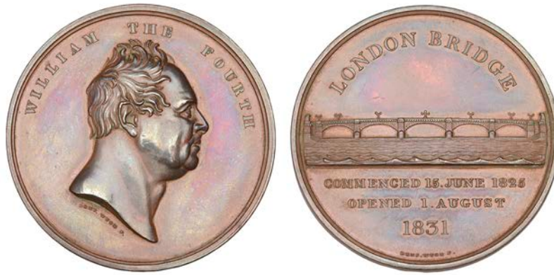
1188 Opening of London Bridge , 1831, a copper medal by B. Wyon, bust of William IV right, rev. view of the bridge, 51mm (BHM 1544; E 1245). Good very fine £80-£100