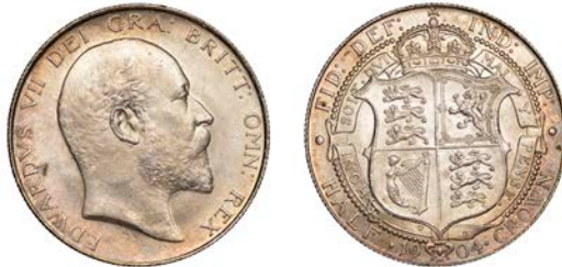
647 Halfcrown, 1904 (ESC 3570; S 3980). About mint state, very rare thus