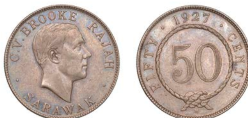
1134 Charles V. Brooke , 50 Cents, 1927H (Prid. 3; KM 19). Toned, good very fine £150-£180