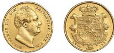
G 544 Sovereign, 1837 (M 21; S 3829B). Possibly removed from a mount, otherwise very fine