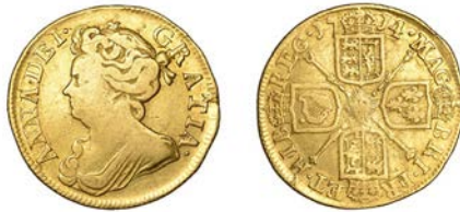
419 Guinea, 1714, third bust (EGC 479; S 3574). Fine £600-£800