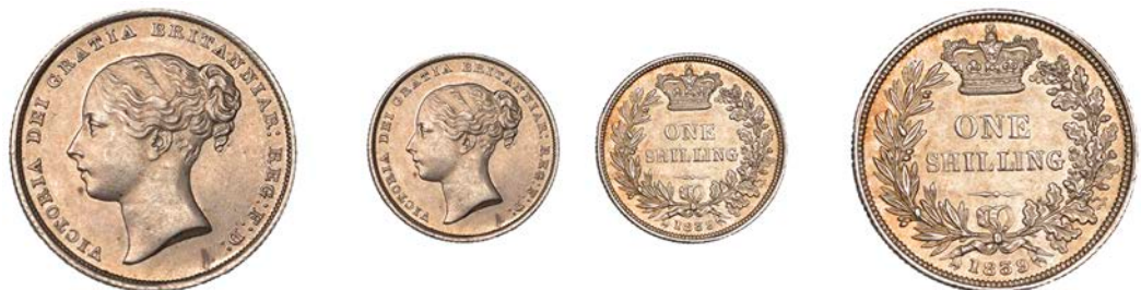
343 Shilling, 1839, second head (ESC 2979; S 3904). A few hairlines, near extremely fine, lightly toned