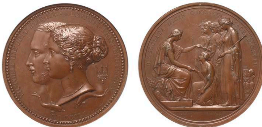
1294 Great Exhibition, Hyde Park , 1851, Prize Medal, a copper award by W. and L.C. Wyon, conjoined busts of Victoria and Albert left, rev. standing figures of the Continents present Industry to Britannia, 77mm (Allen HP-A020; BHM 2462). About extremely fine [certified and graded by NGC as MS 62 BN] £240-£300