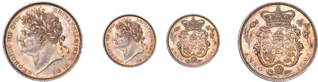
336 Shilling, 1821 (ESC 2396; S 3810). Small spot on reverse, otherwise better than extremely fine