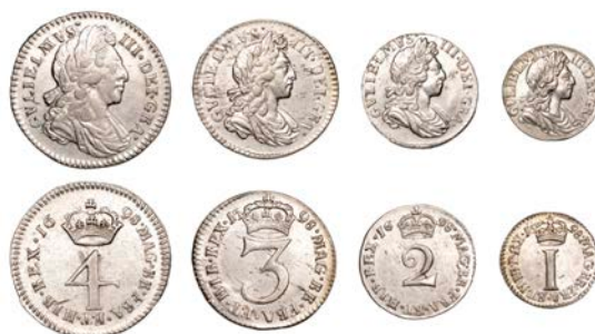
417 Maundy set, 1698 (ESC 1305; S 3553) [4]. Lightly cleaned, otherwise good very fine or better