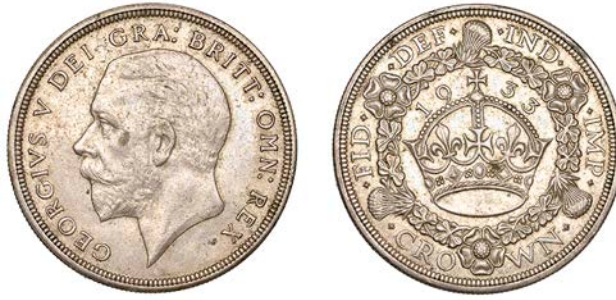
668 Crown, 1933 (ESC 3644; S 4036). A few marks and rim nicks, extremely fine, toned