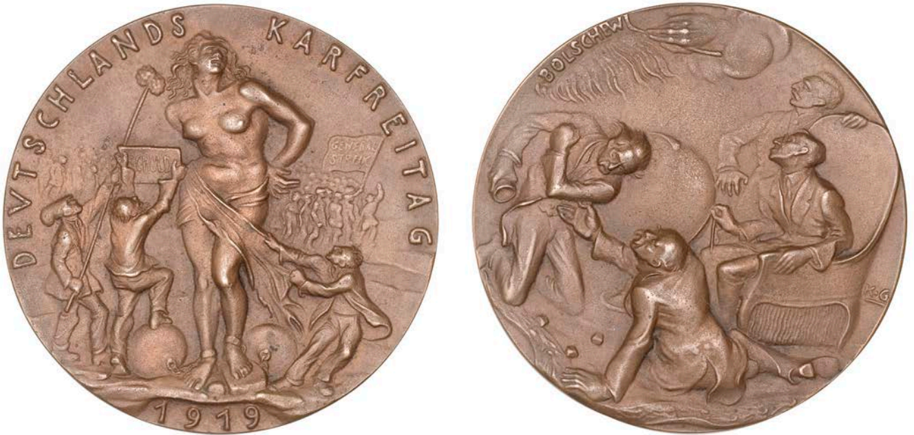
1354 GERMANY, Deutschlands Karfreitag [Germany's Good Friday], 1919, a bronze medal by K. Goetz, standing figure of Germania is stripped of her remaining robes by three men, in the background striking workers hold banners aloft, rev. the victors roll the dice to determine the fate of Germany's robes while watching the clouds of approaching Bolshevism, 90mm (K 224). About extremely fine £240-£300

Provenance: Spink Auction 230, 15 July 2015, lot 296