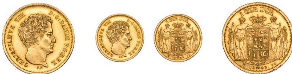
G 1068 Christian VIII, Christian d'or, 1843ff, Altona, 6.63g/12h (Hede 2; KM 730; F 290). Lightly cleaned at one time, otherwise extremely fine, rare