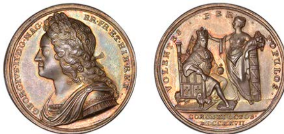
1254 George II, Coronation , 1727, a silver medal by J. Croker, laureate bust left, rev. king, enthroned, being crowned by Britannia who holds cornucopia, 35mm, 17.82g (MI II, 479/4; E 510). Nearly extremely fine and attractively toned £400-£500

Provenance: DNW Auction 193, 6 July 2021, lot 1208