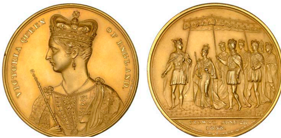
1286 Victoria, Coronation , 1838, a gilt-copper medal by J. Barber for Griffin & Hyams, crowned bust left, rev. Queen and courtiers beneath canopy, 61mm (VW & E 92.2; BHM 1803; E 1311). Small obverse edge nick, extremely fine or better; in contemporary case £200-£300