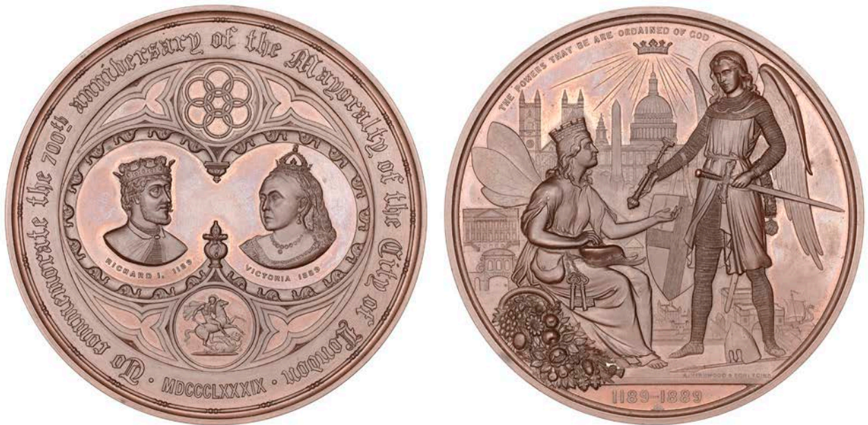
1210 700th Anniversary of the Mayoralty of the City of London , 1889, a bronze medal by A. Kirkwood & Sons for the Corporation of the City of London, busts of Richard I and Victoria vis-à-vis in cartouche, rev. St Michael presenting sceptre to kneeling figure of Londinium, St Paul's behind, 77mm (BHM 3377; E 1752). Extremely fine or better; in fitted case of issue £600-£800