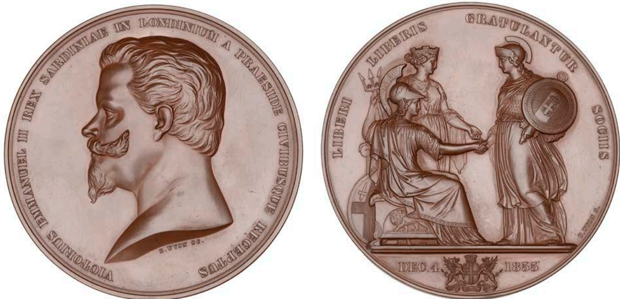
1195 Reception of Victor Emanuel II of Sardinia at the Guildhall, 1855, a copper medal by B. Wyon for the Corporation of the City of London, bare head left, rev. Britannia and Londinia greet Sardinia, 76mm (W & E 717A.1; BHM 2567; E 1499). Good extremely fine; in original case of issue [this faded with one hinge broken] £300-£400

Provenance: A Collection of City of London Medals, the Property of a Gentleman, DNW Auction 138, 12 December 2016, lot 2711