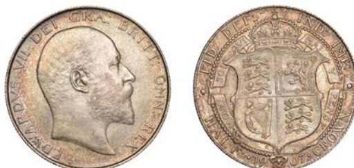
650 Halfcrown, 1907 (ESC 3573; S 3980). About extremely fine, lightly toned