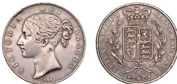
568 Crown, 1844, edge VIII, star stops (ESC 2561; S 3882). Brushed, small dig on neck, otherwise very fine