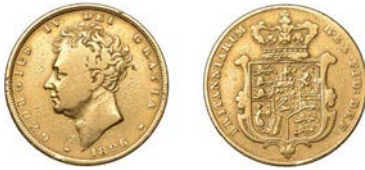
G 512 Sovereign, 1826 (M 11; S 3801). Fine