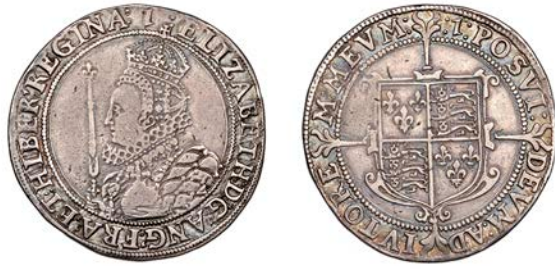
253 Seventh issue, Halfcrown, mm. 1, 14.82g/9h (N 2013; S 2583). About very fine, reverse better, some toning Provenance: Sutton Coldfield Collection