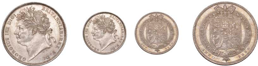
337 Shilling, 1824 (ESC 2400; S 3811). Good extremely fine, lustrous and lightly toned