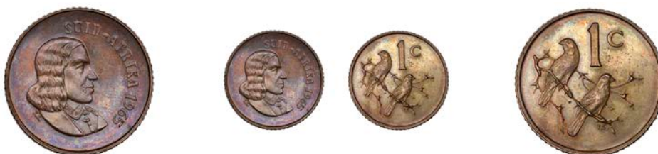
1153 Republic , Proof Cent, 1965, Afrikaans legend, edge grained, thick flan, 2.96g/12h (Hern D18; KM 65.2). About as struck, extremely rare £600-£800