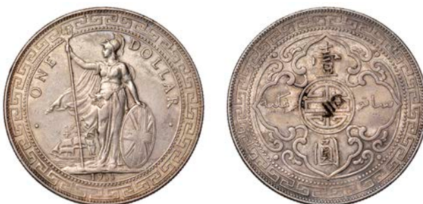
1056 Trade Dollar, 1911 B (Prid. 21; KM T5). Chopmark in centre of reverse, otherwise good very fine with some toning