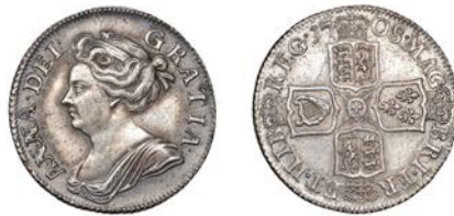
426 Shilling, 1708, third bust (ESC 1399; S 3610). Old heavy tone, extremely fine