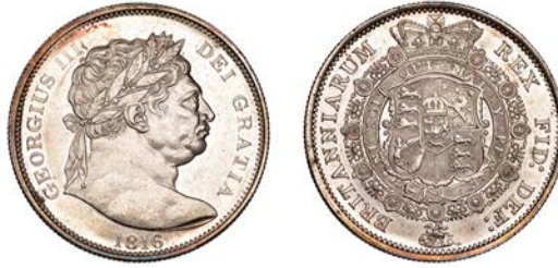
495 Halfcrown, 1816 (ESC 2086; S 3788). Better than extremely fine