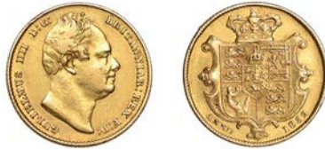
G 542 Sovereign, 1832, second bust (M 17; S 3829B). Wiped, otherwise very fine