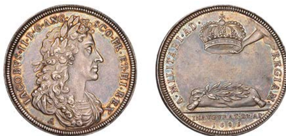
1246 James II, Coronation, 1685 , a silver medal by J. Roettiers, laureate bust right, rev. crown held over wreath on cushion, 34mm, 16.35g (MI I, 605/5; E 273). Extremely fine and toned £400-£600

Provenance: DNW Auction 193, 6 July 2021, lot 1200