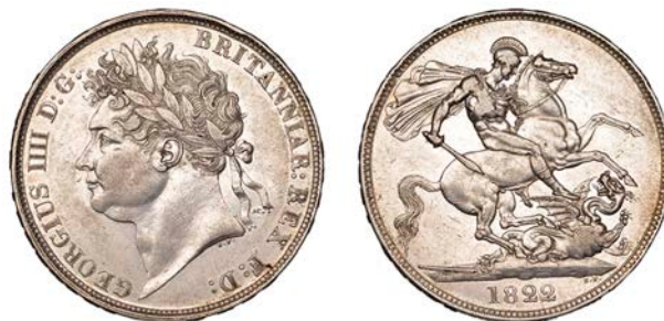
517 Crown, 1822, edge SECUNDO (ESC 2318; S 3805). Very fine, scarce