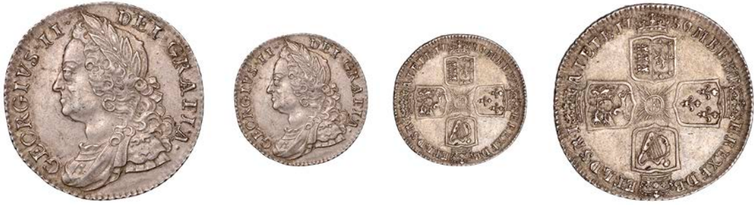
328 Shilling, 1750, thin 0 (ESC 1729; S 3704). Minor surface staining, otherwise about extremely fine