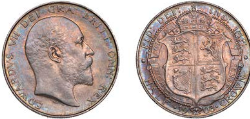
646 Halfcrown, 1903 (ESC 3569; S 3980). Better than very fine, toned, rare