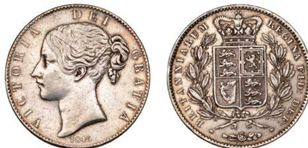
571 Crown, 1845, edge VIII, cinquefoil stops (ESC 2564; S 3882). About very fine