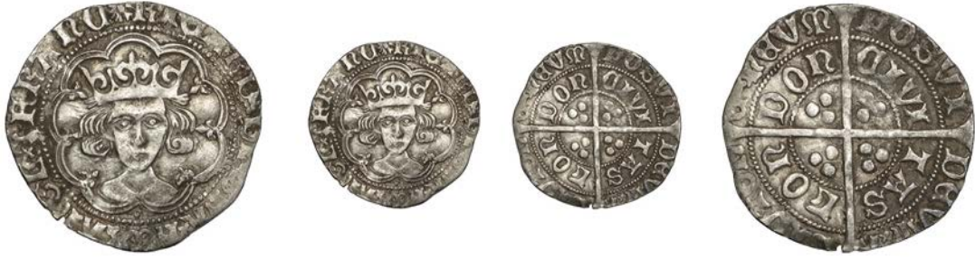
201 Groat, London, type 3, mm. halved sun and rose no. 3 on obv. only, pellet below bust, 2.92g/12h (Winstanley 13; N 1680; S 2158). Very fine, clear portrait, very rare with the mint mark on obverse only £1,500-£2,000