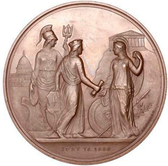
1308 Visit of George I of Greece to London , 1880, a bronze medal by G.G. Adams, bust left, rev. Londinia welcoming Hellas, Britannia behind, 76mm (W & E 1372.1; BHM 3077; E 1668). About extremely fine £200-£260