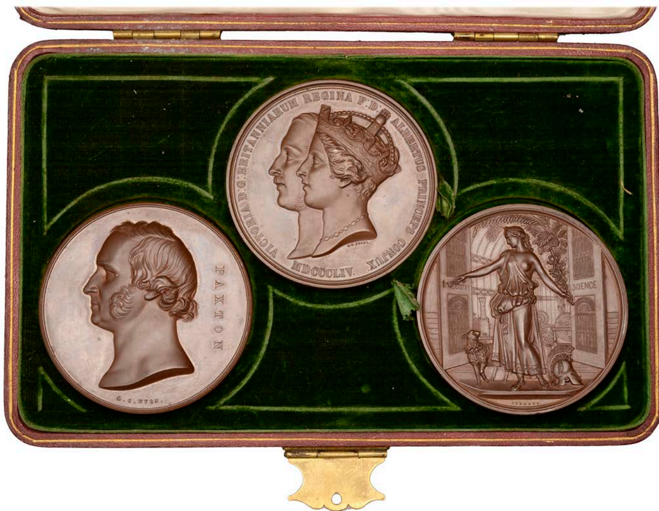
1298 Crystal Palace Opened, Sydenham, 1854 , bronze medals (3), all 64mm, by J.G. Adams, jugate busts left, rev. Britannia standing between industry and commerce (BHM 2545; E 1485), by Pinches, standing muse opening doors to the Crystal Palace, flanked by lamb and Corinthian helmet, rev. view of the exhibition buildings (BHM 2549; E 1487b), by L.C. Wyon for Pinches, bust of James Paxton left, rev. as last, (BHM 2552; E 1487) [3]. Extremely fine or better; in original ornate gilt-blocked case by the Crystal Palace Company, very rare thus £800-£1,000