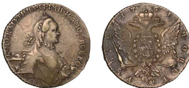
1129 Catherine II , Rouble, 1764я, St Petersburg, 23.05g/12h (Bit. 185; Dav. 1683). Minor surface deposit, otherwise very fine £120-£150 Provenance: D.L.F. Sealy Collection