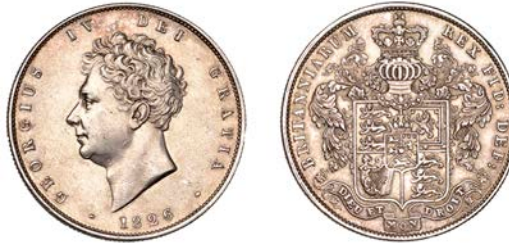
526 Halfcrown, 1826 (ESC 2375; S 3809). Lightly wiped but retaining some lustre, extremely fine