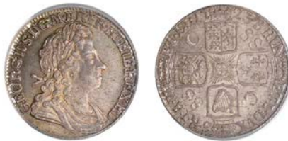
x 433 Shilling, 1723 ss c, first bust, c over ss below DVX (ESC 1590; S 3647). Toned, good extremely fine, scarce [certified and graded by PCGS as MS65]