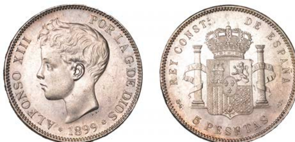
1164 Alfonso XIII , 5 Pesetas, 1899 SG-V (Cayón 17648; KM 707). Some minor marks, otherwise extremely fine £100-£120