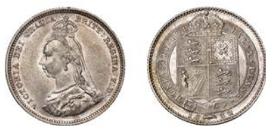
624 Shilling, 1889, small head (ESC 3141; S 3926). Some light surface and rim marks, extremely fine, rare