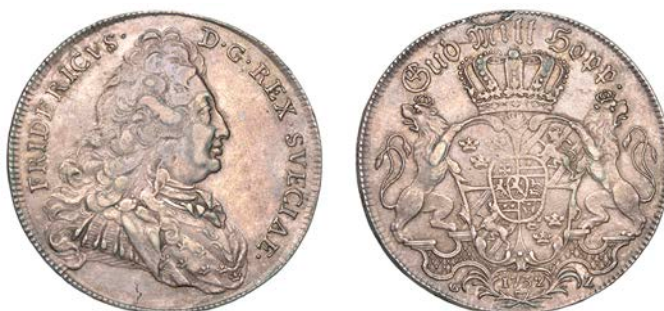
1170 Fredrik I , Riksdaler, 1732 Gz , Stockholm, 29.15g/12h (Delzanno 37; SM 71b; Dav. 1723). Cleaned at one time and now re-toned, light scratches behind head, otherwise very fine