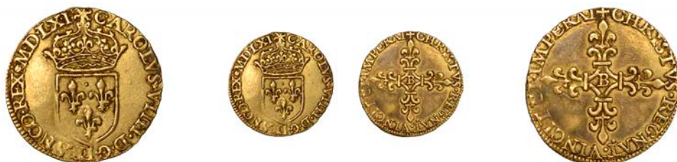
1073 Charles IX , Half-Écu d'or au soleil, 1561 B , Rouen, 1.70g/9h (Dup. 1058; Gad. 439; F 379). Very fine and very rare £1,000-£1,200