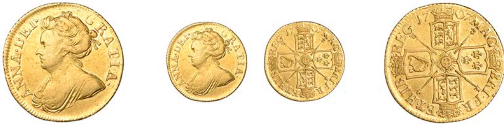
420 Half-Guinea, 1707, eight strings to harp, colon stops after FR, HIB and REG (EGC –; S 3575). Some smoothing, about very fine and very rare, particularly so with the reverse punctuation £1,200-£1,500

Struck from the same dies as the R. Plant specimen (DNW 188, 88)