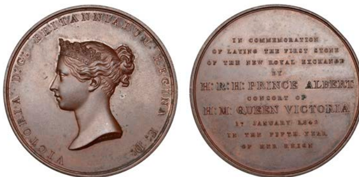
1288 Foundation of the New Royal Exchange , 1842, a copper medal by W. Wyon, diademed head of Victoria left, rev. legend, 45mm (BHM 2078). Extremely fine; in contemporary case of issue £70-£90