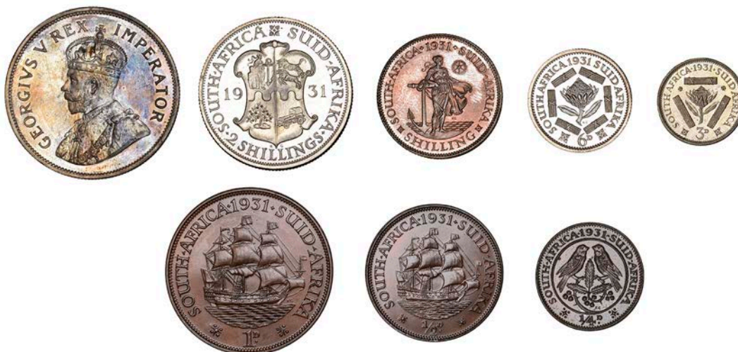
1145 George V , Proof set, 1931, comprising Halfcrown, Florin, Shilling, Sixpence, Threepence, Penny, Halfpenny and Farthing (Hern P7; KM PS6) [8]. About as struck, the Halfcrown and Shilling with light toning, very rare; in card case of issue £8,000-£10,000