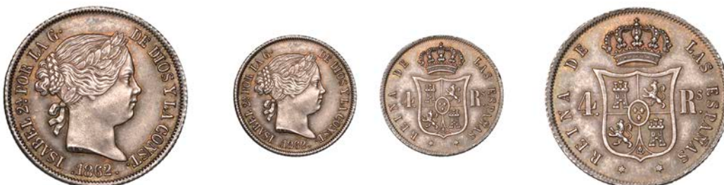
1161 Isabel II , 4 Reales, 1862, Madrid (Cayón 17055; KM 608.2). Extremely fine and toned £150-£180