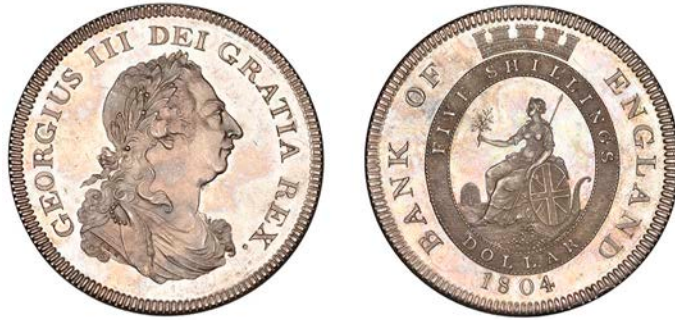
477 Dollar, 1804, types A/2b, κ inverted, edge plain, 27.04g/12h (L & S 56; ESC 1928; S 3768). Hairlined, otherwise about mint state, some brilliance, very rare [certified and graded by NGC as MS 61 PL] £1,000-£1,200