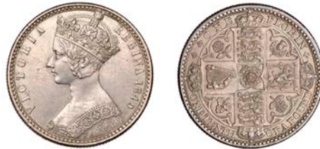
603 Florin, 1849, initials obliterated (ESC 2817; S 3890). Lightly cleaned, otherwise about extremely fine, rare