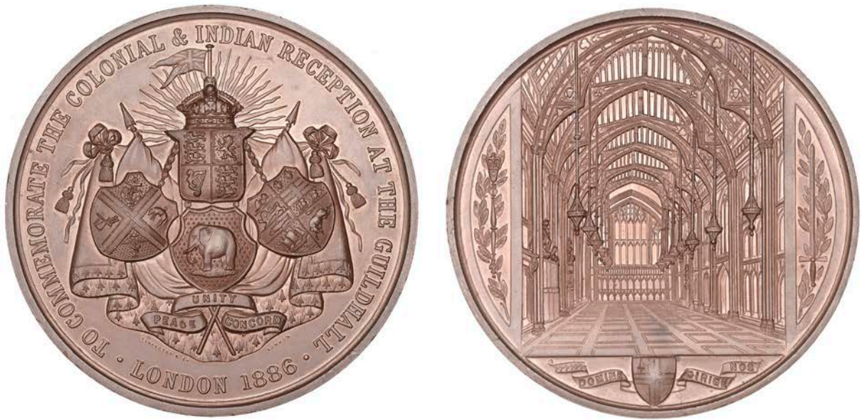
1208 Colonial and Indian Reception at the Guildhall , 1886, a bronze medal by Elkington for the Corporation of the City of London, crowned arms and shields on mantle, rev. interior of the Guildhall, 77mm (BHM 3214; E 1726; Pudd 886.1.1; Taylor 185a). Good extremely fine; in maroon gilt-blocked case of issue £300-£400

Provenance: A Collection of City of London Medals, the Property of a Gentleman, DNW Auction 138, 12 December 2016, lot 2723