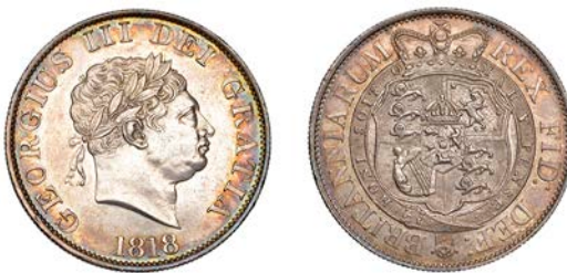
501 Halfcrown, 1818 (ESC 2099; S 3789). Possibly lightly cleaned at one time and now re-toning, otherwise about extremely fine £150-£180