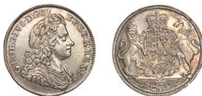
1253 George I , a silver medalet, unsigned and undated, laureate, draped and cuirassed bust right, rev. royal arms in garter with supporters, 25mm (MI II, 428/18; E 471). Lightly cleaned, otherwise about extremely fine £100-£120

Provenance: DNW Auction 193, 6 July 2021, lot 1207