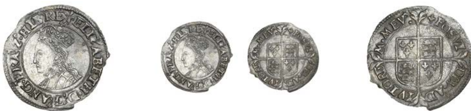
241 First issue, Halfgroat, mm. lis, wire-line inner circles, three marks behind head, bust 1G, 0.94g/1h (N 1987; S 2552). A little edge loss and with a small bend to the flan, otherwise about extremely fine, dark patina, very rare thus