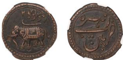
1089 MYSORE, Tipu Sultan , Paisa, Patan, AM1222 [1794-5] (Henderson 126; KM 123.11). Good very fine [certified and graded by NGC as XF 45 BN] £150-£180

The finest of the three examples graded by NGC.