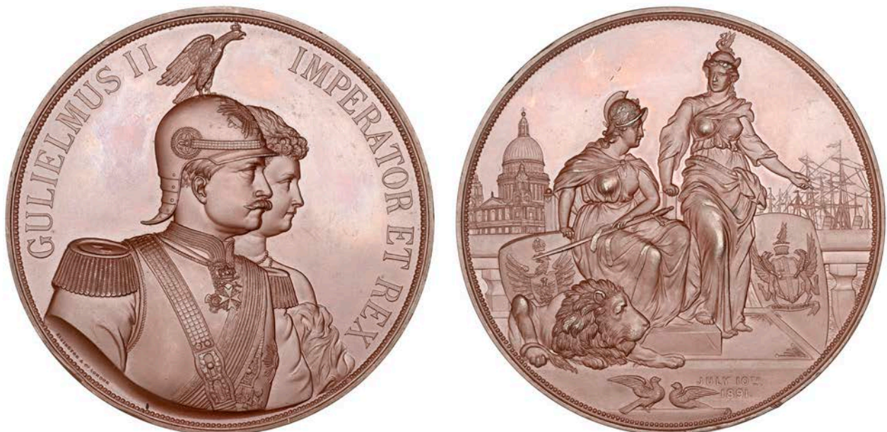
1211 Visit of Emperor Wilhelm II to the City of London , 1891, a bronze medal by Elkington & Co. for the Corporation of the City of London, conjoined busts of the Emperor and Empress three-quarters right, rev. Germania seated to left, Britannia standing to right, each flanked by shield of arms, 80mm (W & E 1668A.1; BHM 3412; E 1768). Extremely fine or better; in original fitted gilt-blocked case of issue £600-£800