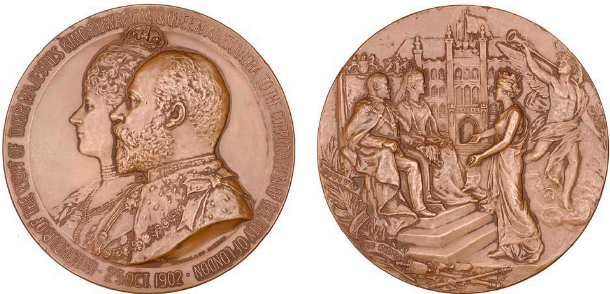
1217 Visit of Edward VII and Queen Alexandra to the Guildhall , 1902, a bronze medal by Searle & Co., conjoined busts left, rev. Londinia presents welcoming address to Their Majesties seated on a dais, 76mm (BHM 3868; E 1874). About extremely fine; in original fitted case of issue £200-£300