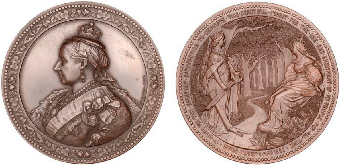
1204 Dedication of Epping Forest , 1882, a copper medal by C. Wiener for the Corporation of London, crowned and draped bust of Queen Victoria left, rev. view of the forest, Londinia standing at left, Victoria seated at right, 76mm (W & E 1400; BHM 3128; E 1689). Extremely fine; in fitted case of issue [this slightly distressed] £400-£500