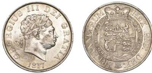
499 Halfcrown, 1817, small head (ESC 2096; S 3789). A few surface marks, sometime cleaned, nearly extremely fine