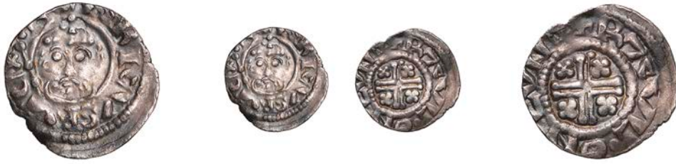
7 Penny, class II, London , Raul, RAUL . ON LVND, 1.40g/5h (SCBI Mass 677ff; N 965; S 1346). Nearly very fine, dark patina £100-£120 Provenance: J.P. Mass Collection [from M. Allen]