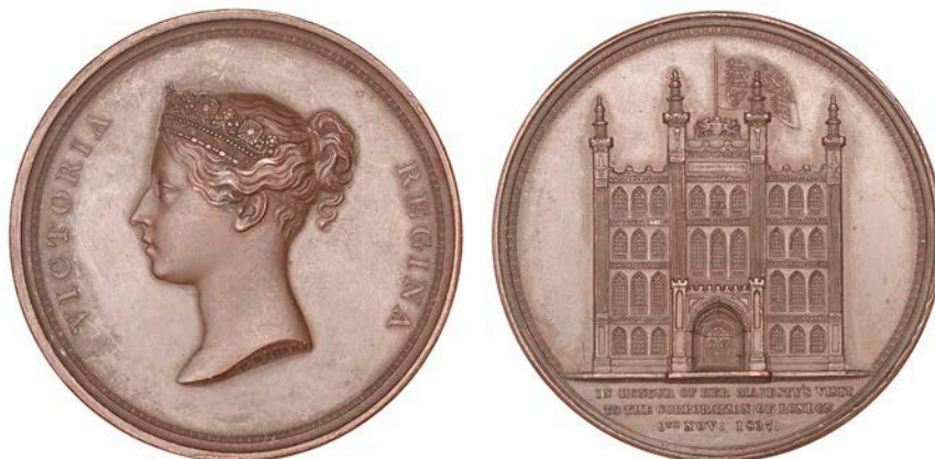
1282 Victoria, Visit to the Guildhall , 1837, a copper medal by W. Wyon for the Corporation of London, diademed bust left, rev. façade of the Guildhall, 55mm (V & E 72; BHM 1775; E 1304). About extremely fine £200-£260