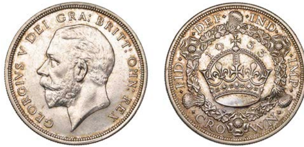
669 Crown, 1933 (ESC 3644; S 4036). Extremely fine or better