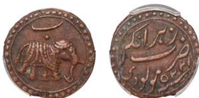
1091 MYSORE, Tipu Sultan , Paisa, Nagar, AM1225 [1797-8] (Henderson 250; KM 103.7). Good very fine, the date rare [certified and graded by PCGS as XF45] £240-£300