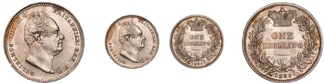
342 Shilling, 1836 (ESC 2494; S 3835). Faint marks on reverse, good extremely fine with some residual lustre