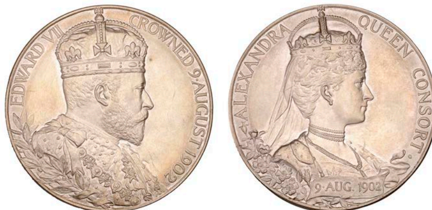
1330 Edward VII, Coronation, 1902 , a silver medal by G.W. de Saulles, crowned bust right, rev. crowned bust of Alexandra right, 55mm, 86.20g (W & E 4100A.4a; BHM 3737; E 1871a). Virtually as struck; in original fitted case £120-£150