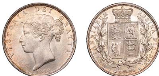
593 Halfcrown, 1880 (ESC 2756; S 3889). About mint state