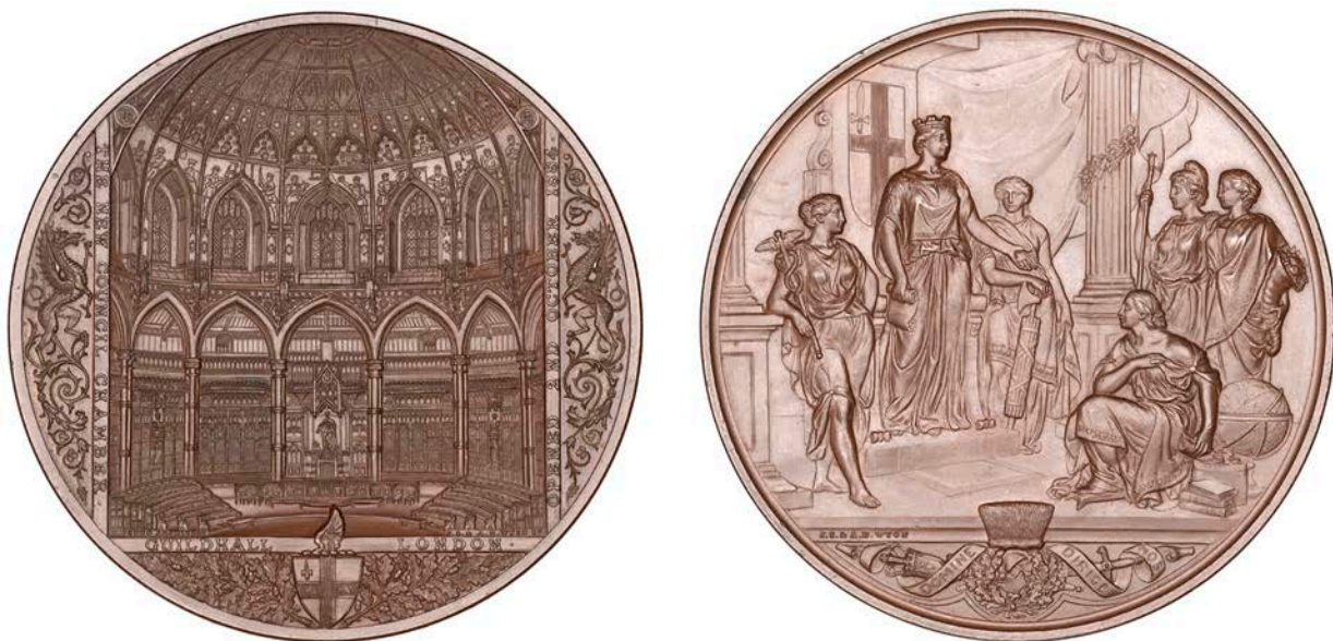
1206 Opening of the New Council Chamber at the Guildhall, 1884 , a bronze medal by J.S. & A.B. Wyon for the Corporation of the City of London, interior of the Chamber, rev. Londinia, attended by Commerce and Magistracy, addressing her council, 77mm (BHM 3177; E 1705; Taylor 206a). About as struck; in fitted case of issue £1,000-£1,200

Provenance: M. Longfield Collection, DNW Auction 138, 12 December 2016, lot 2690