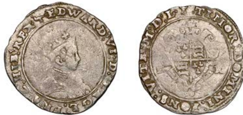
228 Second period, 6 oz. issue, Shilling, MDL, Tower II, mm. martlet on obv., crowned leopard's head on rev., bust 5, 2.58g/1h (Bispham p.137; N 1919/1; S 2466). Surfaces lightly scratched, otherwise about very fine for issue, struck on a lightweight flan; the combination of mint marks extremely rare £700-£900

Struck from the same reverse die as the Shuttlewood coin (245).