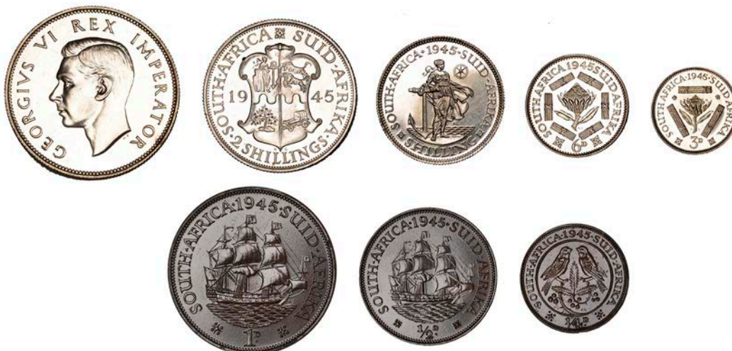
1149 George VI , Proof set, 1945, comprising Halfcrown, Florin, Shilling, Sixpence, Threepence, Penny, Halfpenny and Farthing (Hern P18; KM PS17) [8]. About mint state, the silver brilliant; in blue SAM case of Issue £800-£1,000