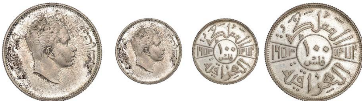
1110 Faisal II , Proof 100 Fils, 1953/AH1372, 10.05g/12h (KM 115). Lightly cleaned, minor discolouration on obverse, otherwise good extremely fine, rare £1,000-£1,200

See St James's Auction 34, 21 September 2015, lot 711, for another Royal Mint trial with a similar reverse.