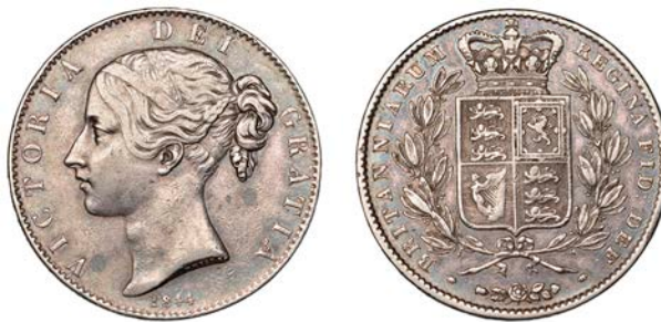
569 Crown, 1844, edge VIII, star stops (ESC 2561; S 3882). Nearly very fine