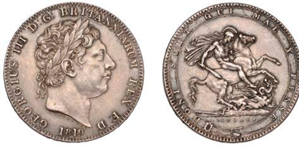
490 Crown, 1819, edge Lx (ESC 2010; S 3787). About extremely fine, toned