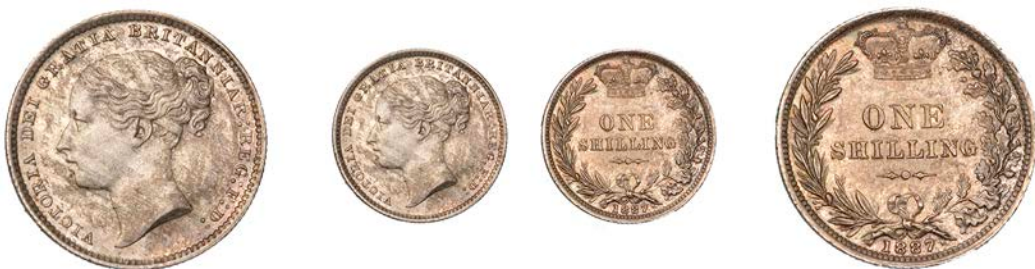
347 Shilling, 1887, young head (ESC 3080; S 3907). Streaky patina, otherwise about as struck, bright fields