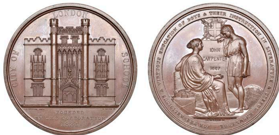
1191 Foundation of the City of London School , 1834, a copper medal by B. Wyon, façade of building, rev. youth with seated figure of Knowledge, 58mm (BHM 1680; E 1279; Taylor 120a). Extremely fine or better; cased £100-£120