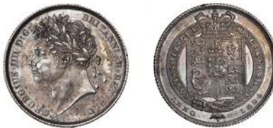
527 Shilling, 1824 (ESC 2400; S 3811). Extremely fine or better, dark tone