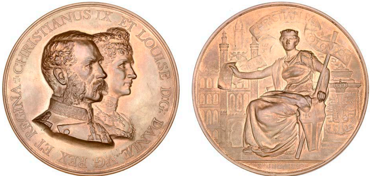
1213 Visit of Christian IX and Louise of Denmark to the City of London , 1893, a light bronze medal by F. Bowcher for the Corporation of the City of London, conjoined busts right, rev. Londinia seated, façade of the Guildhall behind, struck at the Paris Mint, 75mm (W & E 1766A.1; BHM 3454; E 1783). Extremely fine; in fitted case of issue £200-£300