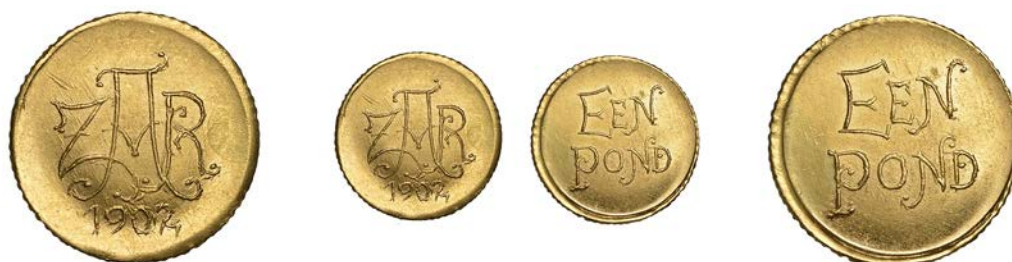
G 1140 Schalk Burger, Veld Pond, 1902, 8.38g/12h (Hern Z54; KM 11; F 4). An exceptional specimen, virtually mint state and very rare thus