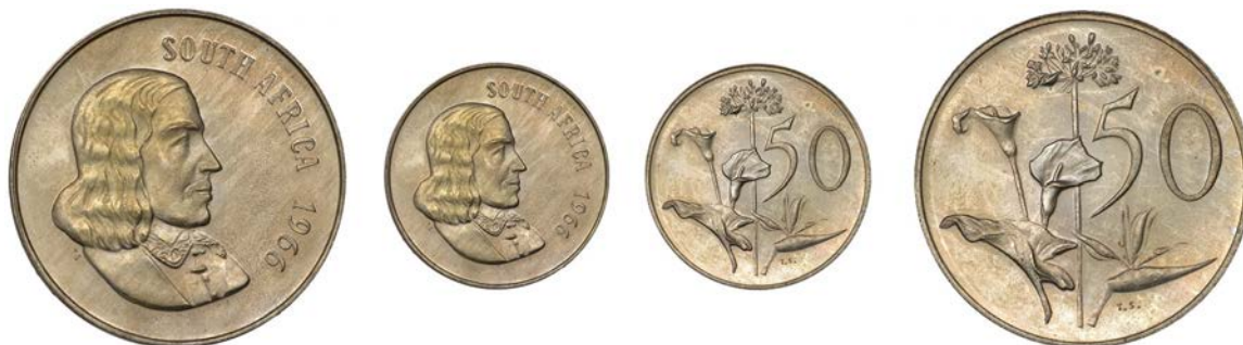
1152 Republic , Proof or Pattern 50 Cents, 1966, by T. Sasseen, in silver, English legend, bust of Jan van Riebeeck right, rev. flowering plant, edge plain, 10.62g/12h (Hern A67; KM –). About mint state, cloudy tone, excessively rare £1,500-£2,000