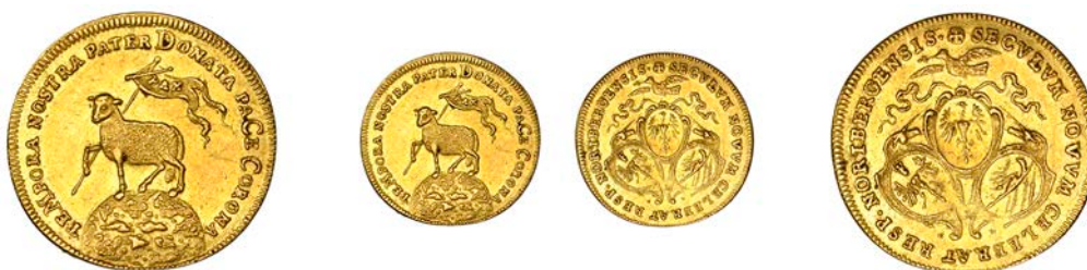
1079 NUREMBERG, Free City , Ducat, 1700GFN, 3.49g/12h (KM 257; F 1885). Good very fine £300-£400