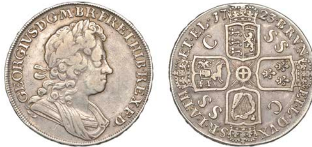
431 Crown, 1723 ss c, edge DECIMO (ESC 1545; S 3640). Small scratch beneath bust, otherwise nearly very fine, toned