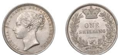
620 Shilling, 1872, die 32 (ESC 3042; S 3906A). Good extremely fine, toned