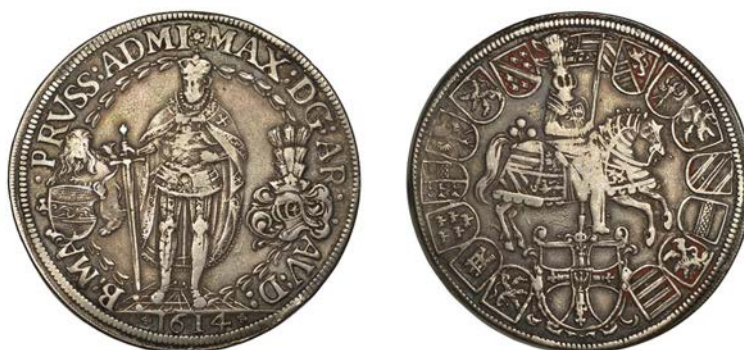
1080 TEUTONIC ORDER, Archduke Maximilian , Double Thaler, 1614, 57.32g/12h (Dav. 5854). Toned, about very fine £600-£800