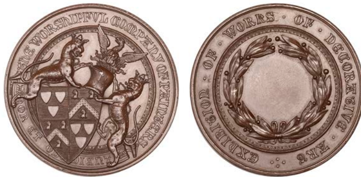
1232 Worshipful Company of Painters , a specimen bronze medal by J.S. Wyon, undated, arms with supporters, rev. wreath, edge stamped '12', 47mm. Extremely fine £100-£120