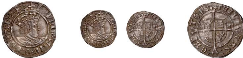
218 Second coinage, Halfgroat, Canterbury, Abp Warham, mm. cross patonce, wa by shield, 1.36g/8h (N 1802; S 2343). Mark on king's chin, otherwise good very fine, dark patina £200-£260