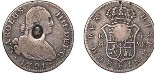
471 SPAIN, Charles IV , 4 Reales, 1791 MF , Madrid, obv. countermarked with head of George III in oval, 12.62g (ESC 1875; S 3767). Fine or better £150-£200