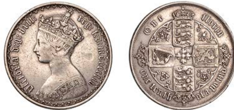
604 Florin, 1854 (ESC 2829; S 3891). Lightly cleaned, some minor marks, otherwise good fine, very rare