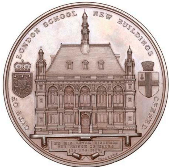
1309 City of London School, New Buildings Opened , 1882, a bronze medal by J.S. & A.B. Wyon for the Corporation of the City of London, conjoined busts of the Prince and Princess of Wales right, rev. frontal elevation of the School, 77mm (W & E 1461A.1; BHM 3133; E 1690; Taylor 202a). Extremely fine £200-£300