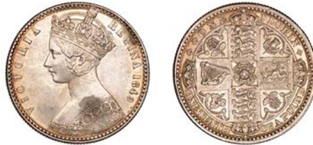
602 Florin, 1849, with initials (ESC 2815; S 3890). Stain on neck and bodice, otherwise about mint state