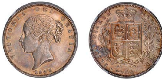
590 Halfcrown, 1843 (ESC 2718; S 3888). Cleaned, otherwise about extremely fine, rare [certified and graded by NGC as AU Details, Cleaned]