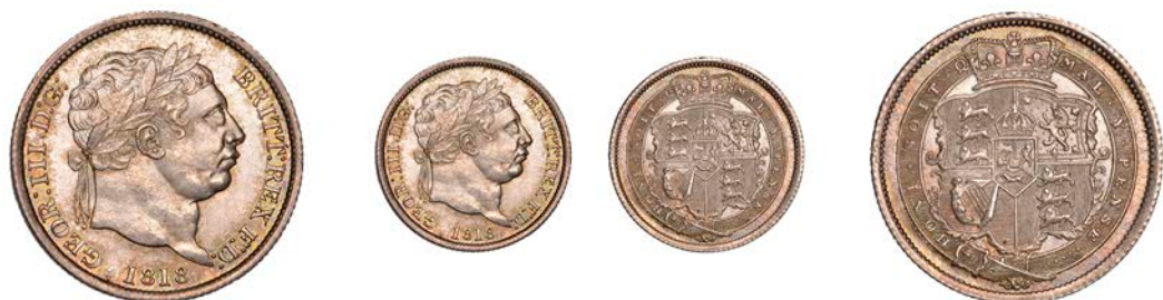
333 Shilling, 1818, last digit of date slightly higher (ESC 2151; S 3790). Good extremely fine, lightly toned with some residual lustre