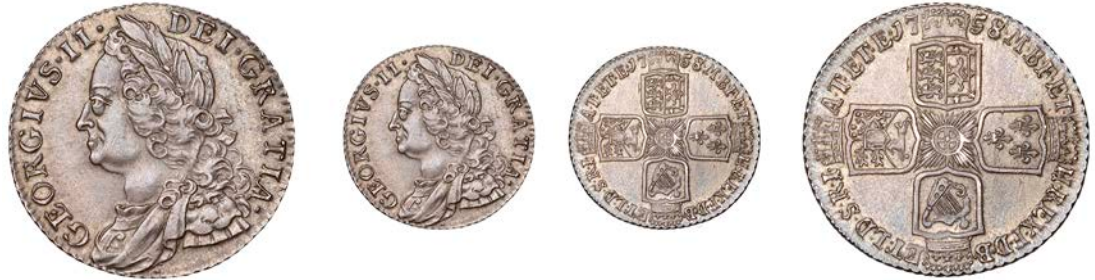
329 Shilling, 1758 (ESC 1734; S 3704). Extremely fine, grey tone