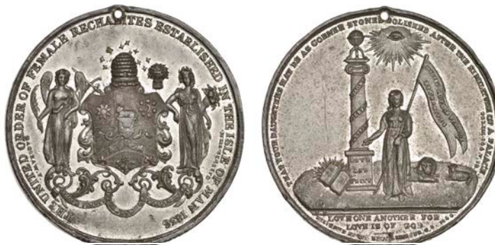
1287 United Order of Female Rechabites , 1840, a white metal medal by T. Bagshaw, shield of arms with supporters, rev. female figure standing holding banner, column to left with ribbon around, 45mm (BHM 1984; Quarmby 158). Pierced, otherwise good very fine, extremely rare £100-£120

Provenance: DNW Auction 148, 18-20 September 2018, lot 1101 (part)