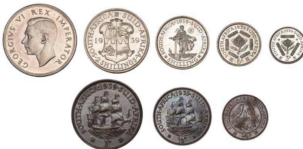
1147 George VI , Proof set, 1939, comprising Halfcrown, Florin, Shilling, Sixpence, Threepence, Penny, Halfpenny and Farthing (Hern P15; KM PS14) [8]. About as struck, very rare; in blue SAM case £15,000-£20,000