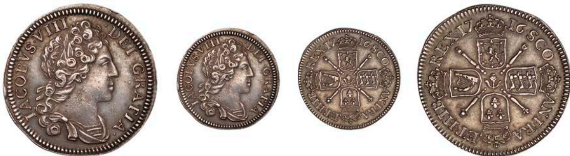
718 James VIII , Pattern Guinea, 1716, type I, restrike by M. Young from dies by N. Roettiers [struck c. 1828], in silver, laureate bust right, reads IACOVS · VIII , etc. rev. cruciform shields, leaved thistle in centre, sceptres in angles, edge plain, 7.29g/6h (Woolf 33:2; B 2, fig. 1095; S 5725). Usual rust marks on obverse die and light scratch on cheek, otherwise extremely fine or better £1,200-£1,500