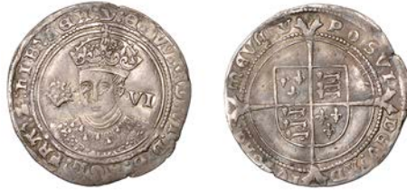
238 Third period, Fine issue, Sixpence, mm. y, 3.10g/4h (N 1938; S 2483). A little weak on king's face, otherwise very fine, rare