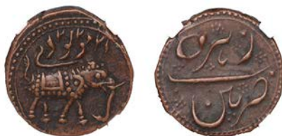
1088 MYSORE, Tipu Sultan , Paisa, Patan, AM1222 [1794-5] (Henderson 125; KM 123.5). Good very fine [certified and graded by NGC as AU 50 BN] £240-£300

The finest of the three examples graded by NGC.