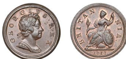
435 Halfpenny, 1717 (BMC 768; S 3659). Good extremely fine, some original colour