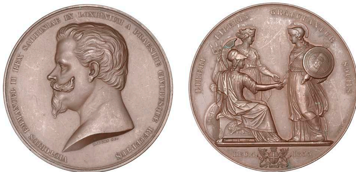
1299 Reception of Victor Emanuel II of Sardinia at the Guildhall, 1855 , a copper medal by B. Wyon for the Corporation of the City of London, bare head left, rev. Britannia and Londinia greet Sardinia, 76mm (W & E 717A.1; BHM 2567; E 1499). Some minor marks, otherwise extremely fine £200-£260