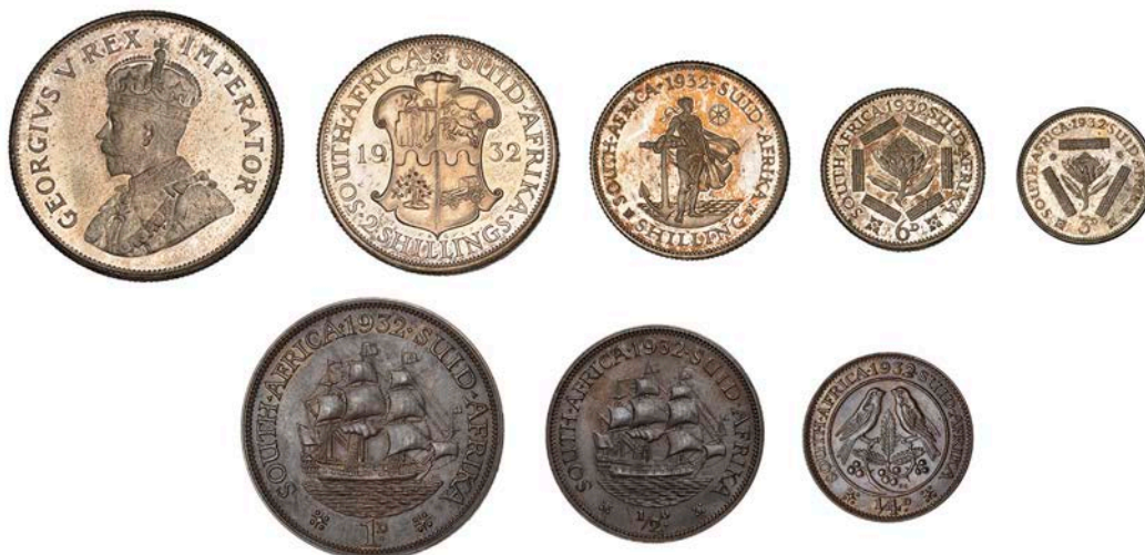
1146 George V , Proof set, 1932, comprising Halfcrown, Florin, Shilling, Sixpence, Threepence, Penny, Halfpenny and Farthing (Hern P8; KM PS7) [8]. About as struck, the silver with light patchy toning over reflective fields, extremely rare; in contemporary Pretoria Mint case £20,000-£30,000