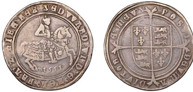
231 Third period, Fine issue, Crown, 1551, mm. y, reads FRA' Z: HIBE (final E over B), 30.33g/3h (Lingford dies F-1; N 1933; S 2478). Fine or better, rare £700-£900