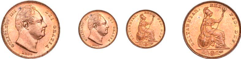
561 Farthing, 1834, rev. B (BMC 1471; S 3848). About as struck with full original colour