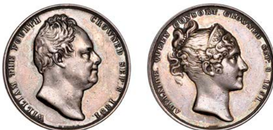
1278 William IV, Coronation , 1831, a silver medal by W. Wyon, bust right, rev. bust of Queen Adelaide right, 33mm, 18.07g (BHM 1475; E 1251). Very fine or better £150-£200