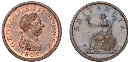
465 Penny, 1806 (BMC 1342; S 3780). Good extremely fine with some original colour on obverse