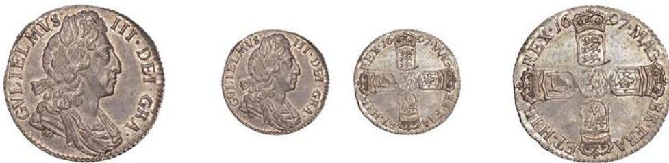
415 Sixpence, 1697, third bust, large crowns, later harp (ESC 1233; S 3538). Extremely fine with attractive gunmetal-grey toning £150-£200