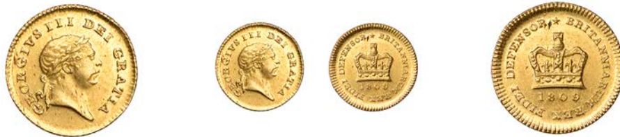
G 458 Third-Guinea, 1810, second bust (EGC 878; S 3740). Light marks, otherwise extremely fine, bright fields