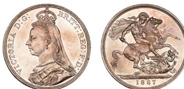
574 Crown, 1887 (ESC 2585; S 3921). Minor bagmarking, otherwise about mint state with reflective satiny fields