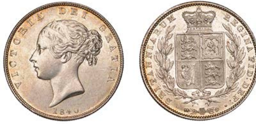
588 Halfcrown, 1840 (ESC 2715; S 3887). Light graze behind head, otherwise about mint state, rare thus