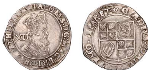
283 Second coinage, Shilling, mm. coronet, fifth bust, 5.91g/7h (N 2101; S 2656). Very fine, good portrait