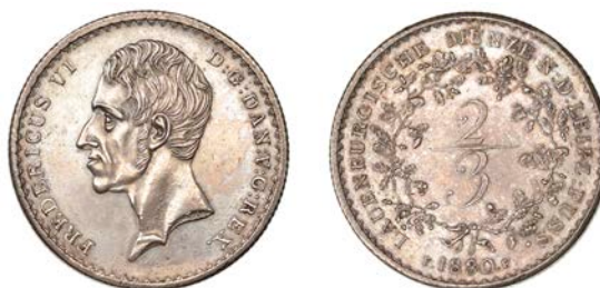
1078 LAUENBURG, Frederick VI of Denmark , Two-Thirds-Thaler, 1830FF, Altona (Hede p.141; KM 25). Cleaned, some minor marks, otherwise about extremely fine £240-£300