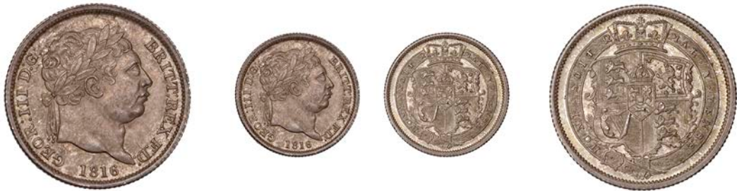
331 Shilling, 1816 (ESC 2140; S 3790). Good extremely fine, grey tone