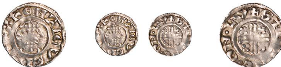
10 Penny, class IIIab2, London , Stivene, STIVENE . ON . LV, 1.45g/12h (SCBI Mass 797ff; N 967; S 1347). Centres weak, good fine £80-£100