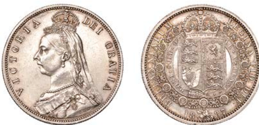
599 Halfcrown, 1887, Jubilee head (ESC 2771; S 3924). A few hairlines, otherwise extremely fine