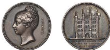
1284 Victoria, Visit to the City of London , 1837, a silver medalet by W. Wyon, head left, rev. façade of the Guildhall, 22mm, 6.74g (V & E 73; BHM 1777; E 1305). Good very fine, rare in silver £100-£120