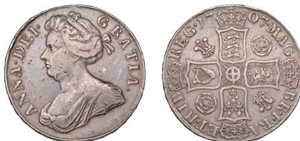
422 Crown, 1707, roses and plumes, edge SEXTO (ESC 1343; S 3578). Some minor obverse surface marks, otherwise good fine or better £300-£400