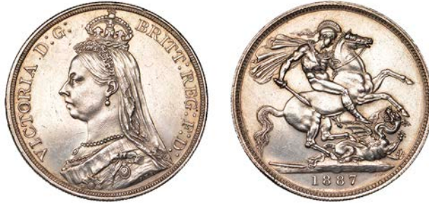
575 Crown, 1887 (ESC 2585; S 3921). A few obverse hairlines and bagmarks, edge nick at 1 o'clock, otherwise extremely fine or better with square rims and lightly reflective fields £150-£200