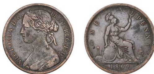
632 Penny, 1869, dies Jg (Gouby A; F 59; BMC 1685; S 3954). Fine or better, some surface deposits, rare £100-£150