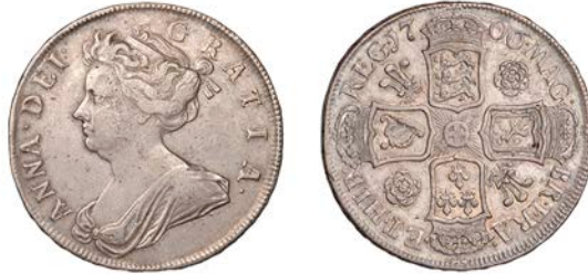
424 Halfcrown, 1706, roses and plumes, edge QUINTO (ESC 1361; S 3582). About very fine