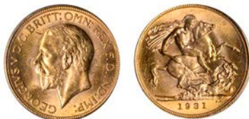
G 1142 George V , Sovereign, 1931 SA (Hern S346; Bentley 930; M 295; S 4005). About as struck [certified and graded by PCGS as MS62] £300-£340