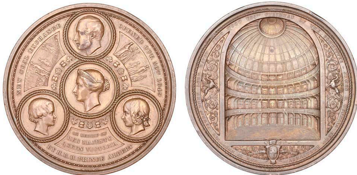
1291 Opening of the New Coal Exchange, 1849 , a copper medal by B. Wyon for the Corporation of the City of London, medallion portraits of the Queen, Prince Albert, the Prince of Wales and the Princess Royal, rev. interior of the Coal Exchange, 89mm, flan thickness 10mm (W & E 581A.2; Taylor 161c; BHM 2357; E 1435). Cleaned, otherwise good very fine, rare £150-£180