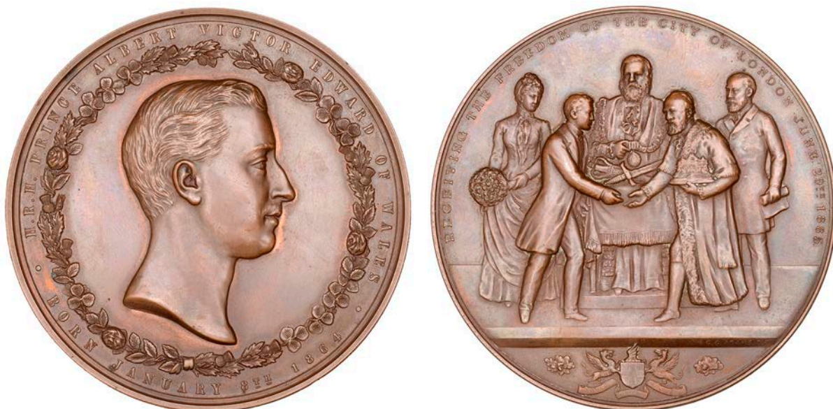
1207 Prince Albert Victor Receives the Freedom of the City of London, 1885 , a bronze medal by G.G. Adams for the Corporation of the City of London, bare head right within wreath, rev. Prince and Princess of Wales watch Prince Albert receive the Freedom of the City from the Lord Chamberlain, 77mm (W & E 1500A.1; BHM 3182; E 1717). Extremely fine; in maroon leather gilt-blocked case of issue [this a little tired] £200-£260

Provenance: M. Longfield Collection, DNW Auction 138, 12 December 2016, lot 2690