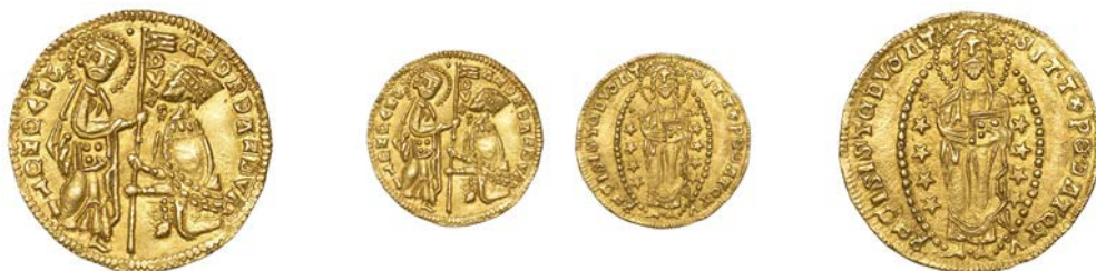
1113 VENICE, Andrea Contarini (1368-82), Ducato, possibly imitative, reads AZDR DAZDVR, 3.51g/6h (cf. Paolucci 1; Gamb. 118). About extremely fine £300-£400