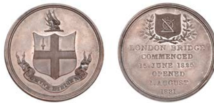
1189 Opening of London Bridge , 1831, a copper medal by B. Wyon, arms, crest and motto of the City of London, rev. inscription, Bridge House Estates mark within oak wreath above, 27mm (BHM 1545; E 1247). Extremely fine; in fitted contemporary case £60-£80