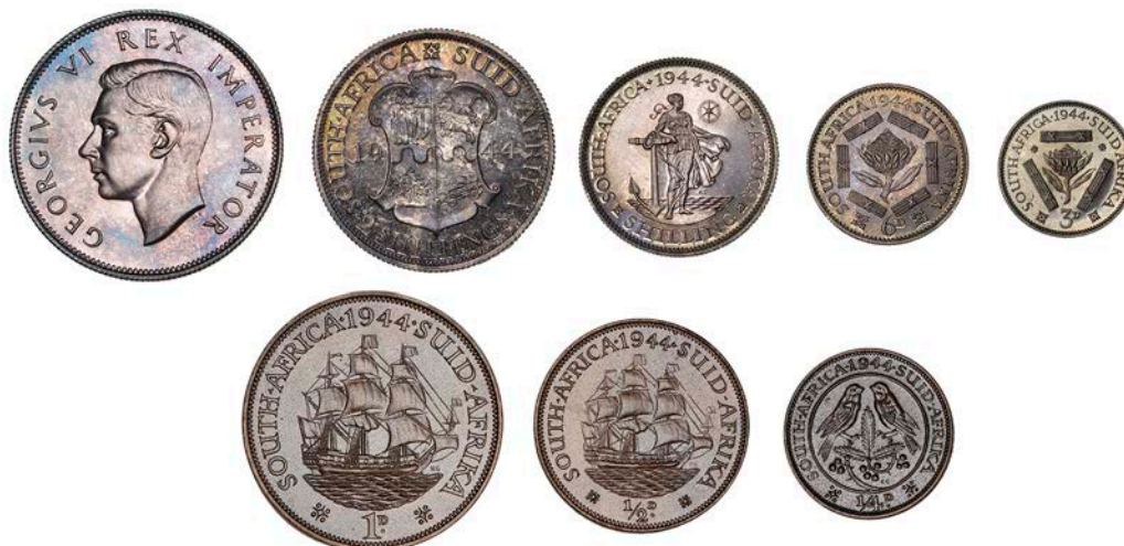
1148 George VI , Proof set, 1944, comprising Halfcrown, Florin, Shilling, Sixpence, Threepence, Penny, Halfpenny and Farthing (Hern P17; KM PS16) [8]. About mint state, the silver toned; in blue SAM case of Issue £800-£1,000