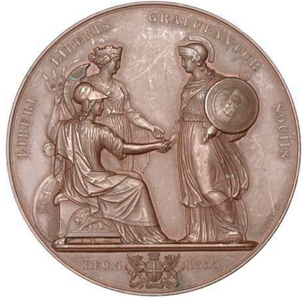
1300 Reception of Victor Emanuel II of Sardinia at the Guildhall, 1855 , a copper medal by B. Wyon for the Corporation of the City of London, bare head left, rev. Britannia and Londinia greet Sardinia, 76mm (W & E 717A.1; BHM 2567; E 1499). Some minor marks, otherwise extremely fine £200-£260