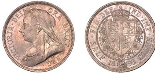
600 Halfcrown, 1893 (ESC 2778; S 3938). Virtually mint state with reflective fields and light toning