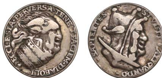
1250 Anti-Papal , a cast silver medal, undated [17th century], reversible heads of the Pope and the Devil, rev. reversible heads of a cardinal and a fool, 34mm, 12.46g. Good fine £100-£120