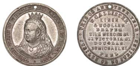
1315 Victoria, Golden Jubilee , 1887, Isle of Man, Douglas and Peel, William Callister, a white metal medal, unsigned, crowned and veiled bust three-quarters left, rev. legend, edge plain, 30mm (W & E 2740B.1; Quarmby 174; Mackay –; cf. Cain 2803). Pierced as issued, obverse about very fine, reverse better than very fine but lightly lacquered, extremely rare, very few specimens known £100-£120

Provenance: H.F. Guard Collection, Spink Auction 182, 29 June 2006, lot 534; DNW Auction 132, 15-18 September 2015, lot 407