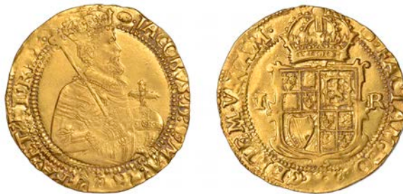
279 Second coinage, Unite, mm. tun (over cinquefoil on obv. ), fifth bust, 10.17g/8h (SCBI Schneider –; N 2085; S 2620). Perhaps lightly cleaned, scratch in reverse field, otherwise very fine, good portrait £1,800-£2,200