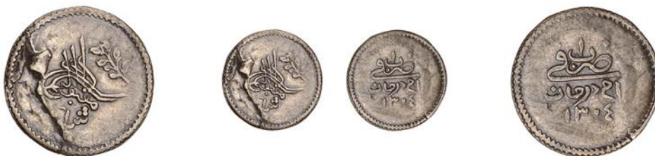
1169 ‘Abd Allah b. Muhammad al-Khalifa , Piastre, Omdurman 1304h, yr 1, 1.08g/1h (KM 4). Flan flaw on obverse, otherwise very fine, extremely rare