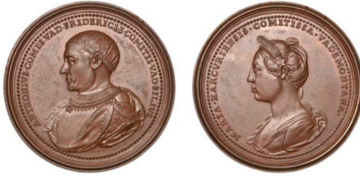
340 LORRAINE, Antoine of Vaudemont & Marie d'Harcourt , a copper medal by F. de Saint-Urbain, undated, 46mm (BDM V, 310, no. 43). Extremely fine £80-£100