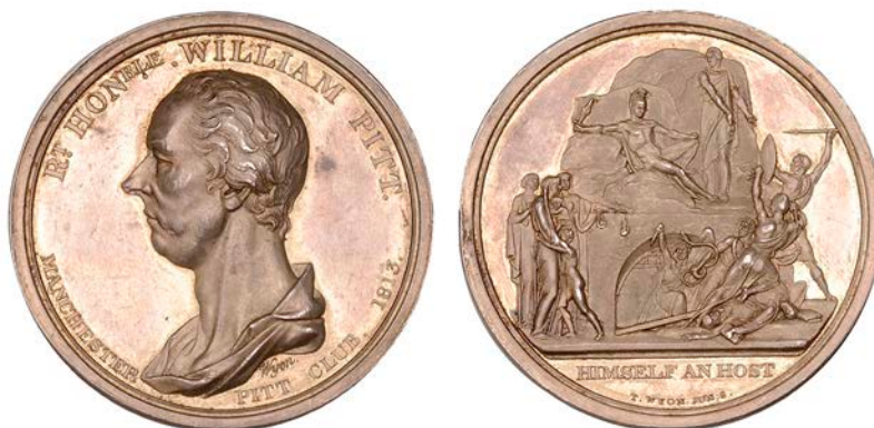
132 Manchester Pitt Club , 1813, a silver medal by T. Wyon Jr, bust left, rev. allegory of Pitt rousing Genius to resist the demons of anarchy, 50mm (BHM 771; E 1039). Small edge piercing at 3 o'clock, unglazed, nearly extremely fine and toned £100-£150