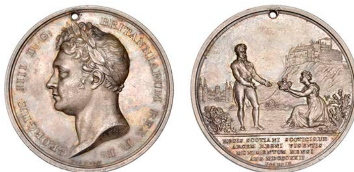
x 146 George IV, Visit to Scotland, 1822 , a silver medal by W. Bain, laureate head left, rev. Scotia, kneeling, presents crown to King, Edinburgh Castle in background, 45mm, 41.34g (BHM 1178; E 1162). Holed at top, some minor marks, otherwise about extremely fine, toned £100-£120