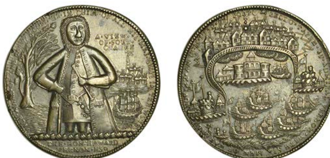
102 Capture of Fort Chagre , 1740, a silver-plated pinchbeck medal, unsigned, three-quarter length figure of Vernon facing, tree to left, Fort Chagre and ship to right, rev. six ships outside Portobello harbour, 40mm, 18.89g/12h (Adams FCv 3-B; Betts 279; MI II, -). Minor edge flaws, otherwise about extremely fine £300-£400

Provenance: O.F. Parsons Collection, Baldwin Auction 12, 27 May 1997, lot 1003