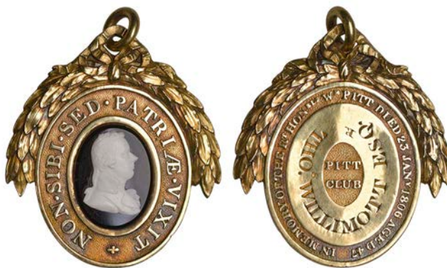
130 Pitt Club , an oval gilt-silver badge, c. 1810-15, bust in white onyx on black onyx field, rev. named (Thos Willmott Esqr), 45 x 40mm (W 1982; D & W 176/582). Test-mark on edge, otherwise good very fine; with integral loop and ring for suspension £200-£260