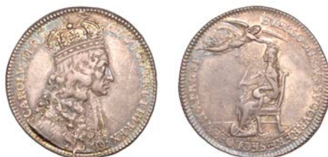
76 Charles II, Coronation, 1661 , a silver medal by T. Simon, crowned bust right, rev. king enthroned, being crowned by Peace, 30mm, 7.24g (MI I, 472/76; E 221). Nearly very fine, toned £200-£260

Provenance: M. Lessen Collection, Part 4, DNW Auction 186, 21 January 2021, lot 1230 [from Baldwin 1994]