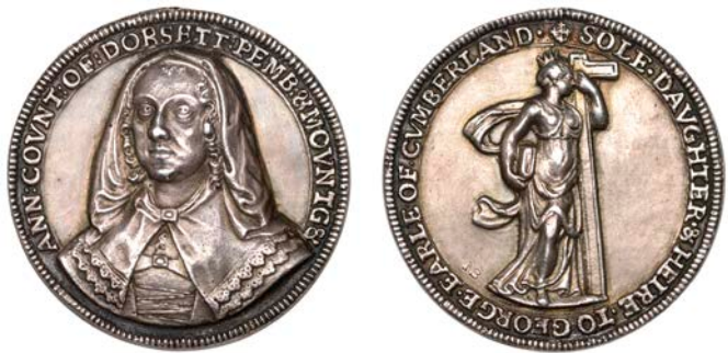
83 Anne, Countess of Dorset, Memorial , [1676], a cast silver medal, unsigned, veiled bust facing three-quarters left, rev. Faith standing, holding bible and long cross, small MB monogram stamped in field, 42mm, 38.41g (MI I, 567/233; E 255b). A later cast, possibly 18th century; traces of mounting at top, otherwise good very fine £150-£180

Anne Clifford, Countess of Dorset, Pembroke and Montgomery (1590-1676)