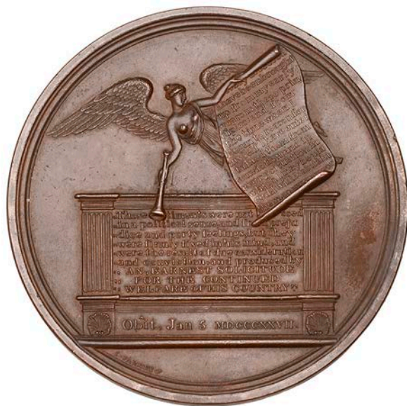
148 Death of the Duke of York, 1827 , a copper medal by I. Parkes, bust in high relief three-quarters left, rev. angel holding scroll and trumpet flying above monument, 76mm (BHM 1282). About extremely fine £100-£120