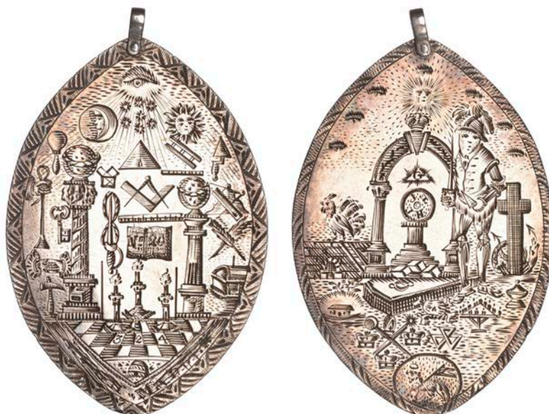
120 Freemasonry , an engraved silver medal, undated [possibly 18th century], 71 x 50mm, 15.26g. Some scratches, otherwise very fine, rare; suspension loop added at top £100-£120