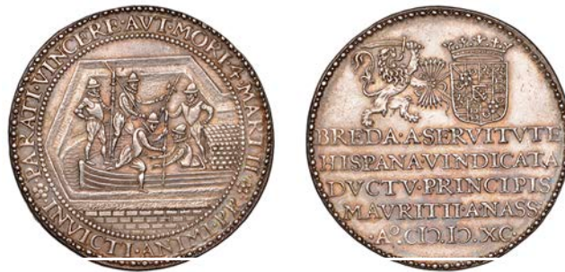
345 NETHERLANDS, Capture of Breda, 1590 , a silver medal, unsigned [by G. van Bijlaer?], five soldiers in boat, rev. legend in five lines, lion and crowned arms above, 40mm, 18.21g. Lightly cleaned at one time and now re-toned, otherwise good very fine £200-£260