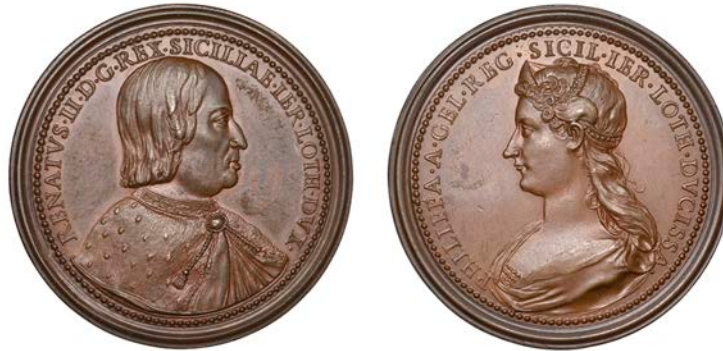
341 LORRAINE, René II & Philippa of Gelderland , a copper medal, unsigned [by F. de Saint-Urbain], undated, 46mm (BDM V, 310, no. 45). Extremely fine £80-£100