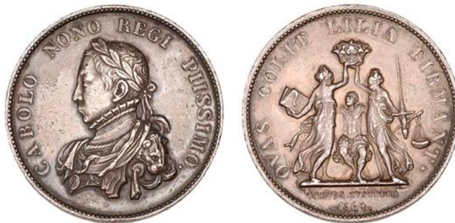
266 FRANCE, Charles IX, 1564 , a silver medal, unsigned [by A. Brucher], laureate, armoured and draped bust left, rev. QVAS COLIT LILIA FIRMIANT, Piety and Justice standing, holding crown above head of seated king, 42mm, 46.40g (CGMP 1, p. 115). A later striking, possibly 18th century; some contact marks, otherwise good very fine and toned £300-£400

Provenance: WAG Online Auction 73, 12 March 2017, lot 270