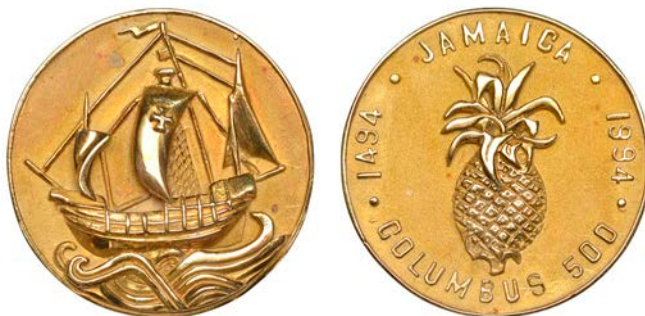
332 JAMAICA, 500th Anniversary of the Arrival of Columbus, 1994 , a gold medal, unsigned [by J. Garvan], ship in high relief sailing left, rev. pineapple, 41mm, 58.51g. About extremely fine, very rare £1,800-£2,200

Reportedly only 3 examples struck in gold