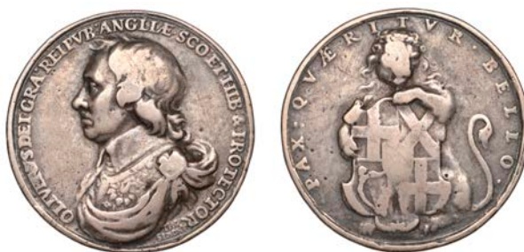
72 Oliver Cromwell, Lord Protector , [1653], a cast silver medal by T. Simon, armoured and draped bust left, rev. PAX QVÆRITVR BELLO, lion sejant holding shield, 37mm, 11.52g (MI I, 409/45; E 188b). A later cast, good fine £150-£180