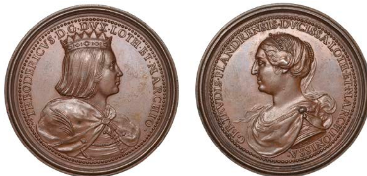
334 LORRAINE, Thiéry & Gertrude of Flanders , a copper medal by F. de Saint-Urbain, undated, 47mm (BDM V, 310, no. 24). About extremely fine £70-£90

Reportedly only 4 examples struck in silver