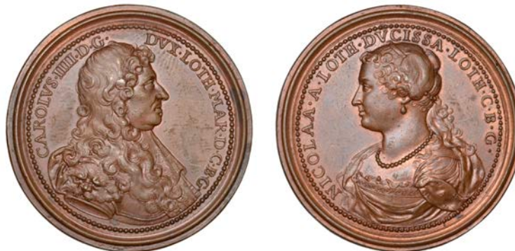
342 LORRAINE, Charles IV & Nicole of Lorraine , a copper medal by F. de Saint-Urbain, undated, 47mm (BDM V, 310, no. 51). About extremely fine with some original colour £70-£90