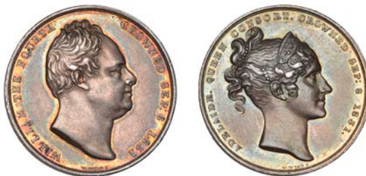
28 William IV, Coronation , 1831, a silver medal by W. Wyon, bust right, rev. bust of Queen Adelaide right, 33mm, 18.25g (BHM 1475; E 1251). Good very fine £150-£200