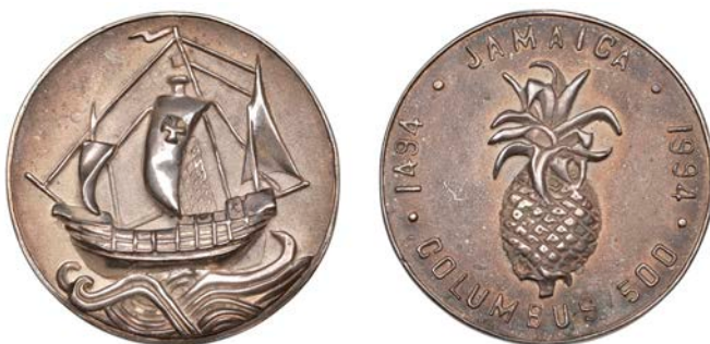
333 JAMAICA, 500th Anniversary of the Arrival of Columbus, 1994 , a silver medal, unsigned [by J. Garvan], similar, 41mm, 33.64g. About extremely fine, very rare £100-£120

Reportedly only 3 examples struck in gold