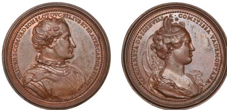
339 LORRAINE, Ferry I of Vaudemont & Marguerite de Joinville , a copper medal by F. de Saint-Urbain, undated, 47mm (BDM V, 310, no. 41). Extremely fine £80-£100