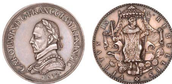
267 FRANCE, St Bartholomew's Day Massacre, 1572 , a silver medal, unsigned [by G. Pilon & A. Olivier], laureate, armoured and draped bust of Charles IX left, rev. VIRTVS IN REBELLES, king enthroned facing beneath canopy, 37mm, 18.57g (CGMP 1, p.117). A later striking, possibly 18th century; about extremely fine £150-£180

Provenance: WAG Online Auction 73, 12 March 2017, lot 270