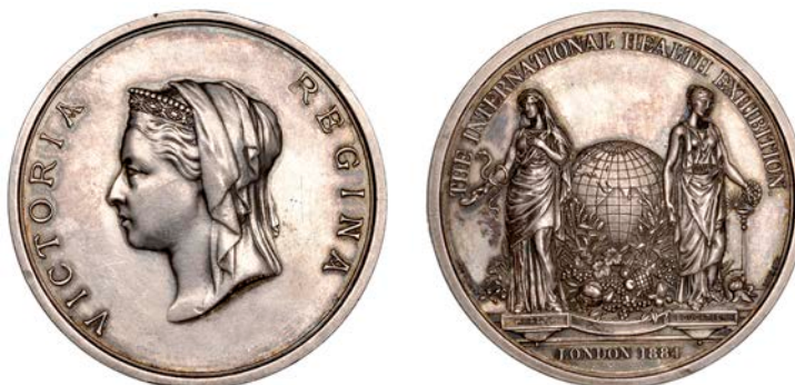
178 International Health Exhibition, London, 1884 , a silver medal by J.C. Wyon & J. Pinches, diademed and veiled head of Victoria left, rev. globe flanked by two standing female figures, 46mm (BHM 3175). Lightly cleaned, otherwise about extremely fine £80-£100