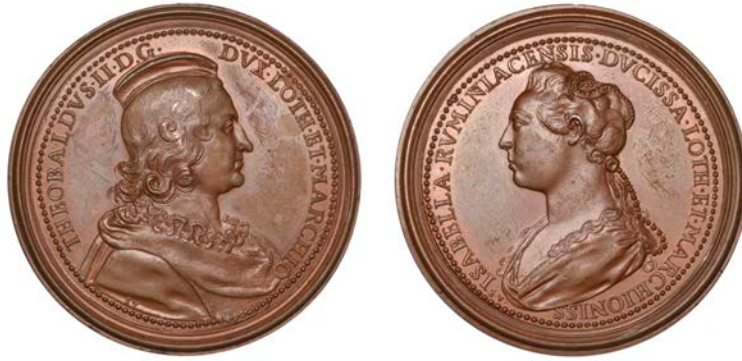
336 LORRAINE, Thiébauld II & Isabella of Rumigni , a copper medal by F. de Saint-Urbain, undated, 47mm (BDM V, 310, no. 33). Extremely fine £80-£100