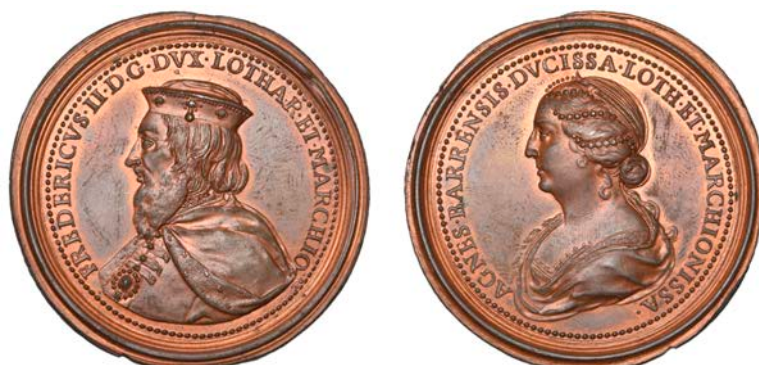
335 LORRAINE, Ferry II & Agnès of Bar , a copper medal by F. de Saint-Urbain, undated, 48mm (BDM V, 310, no. 29). Extremely fine with some original colour £80-£100