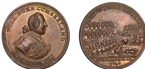
x 107 Battle of Culloden , 1746, a pinchbeck medal, unsigned, bust of the Duke of Cumberland right, rev. battle scene, 37mm (Woolf 55:9; MI II, 612/275). Traces of verdigris, otherwise about extremely fine £80-£100