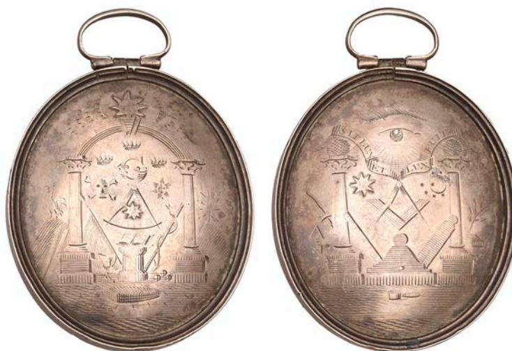
121 Freemasonry , an engraved silver medal, formed of two plates joined by a silver rim, undated, 54 x 46mm, 42.84g. About very fine; with loop for suspension £80-£100