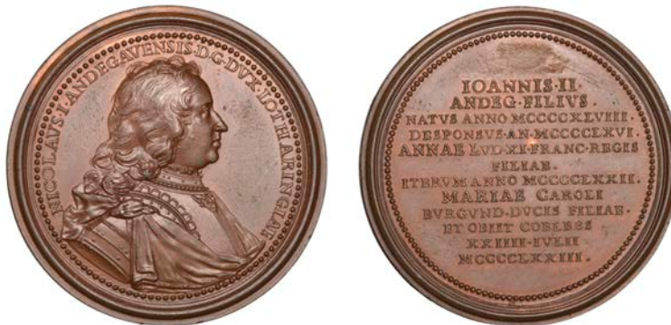
338 LORRAINE, Nicholas of Anjou , a copper medal by F. de Saint-Urbain, undated, 47mm (BDM V, 310, no. 40). Extremely fine £80-£100