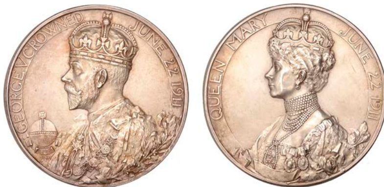
217 George V, Coronation , 1911, a silver medal by B. Mackennal, crowned bust of George left, rev. crowned bust of Mary left, 51mm (W & E 5035A.2; BHM 4022). Lightly brushed, otherwise extremely fine; in case of issue £80-£100