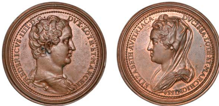
337 LORRAINE, Ferry IV & Isabelle of Austria , a copper medal by F. de Saint-Urbain, undated, 47mm (BDM V, 310, no. 34). Extremely fine with some original colour £80-£100