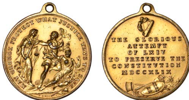
x 108 Dissensions between Dr Charles Lucas and the Corporation of Dublin , 1749, a gilt-copper medal by T. Pingo, Justice restraining Anarchy from destroying Liberty, her cap and staff on ground, rev. THE GLORIOUS ATTEMPT OF LXIV TO PRESERVE THE CONSTITVTION MDCCLXIX, harp above, shield and regalia of Dublin below, edge plain, 40mm (Eimer 4; MI II, 653/357; E 623). Gilding slightly worn in places, otherwise good very fine, rare; with integral suspension loop £200-£260