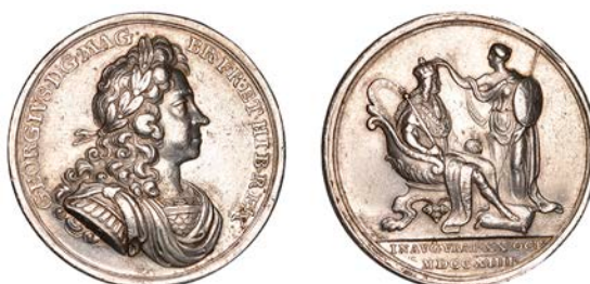
100 George I, Coronation , 1714, a silver medal by J. Croker, laureate bust right, rev. Britannia crowning King, 34mm, 16.06g (MI II, 424/9; E 470). Better than very fine, sometime cleaned £200-£260