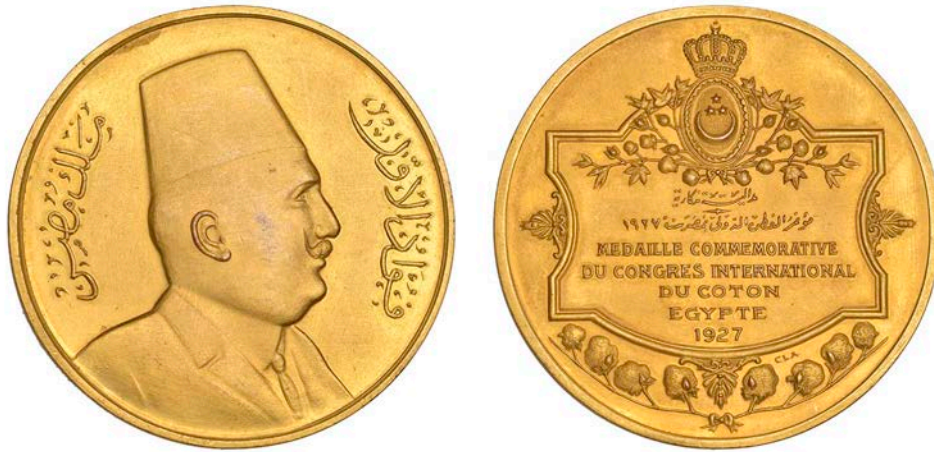
264 EGYPT, International Cotton Congress, 1927 , a gilt-bronze medal, signed C.L.A., bust of Fuad right, rev. inscription within cartouche, 57mm. About extremely fine £200-£260