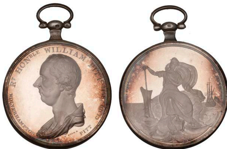
134 Wolverhampton Pitt Club , 1813, a glazed silver medal by P. Wyon, draped bust of Pitt left, rev. figure seated facing on rocks, holding rudder, ship in background to right, 50mm (BHM 772). Brilliant, virtually as struck with some toning; the lunettes joined by silver band, with loop and ring for suspension £300-£400