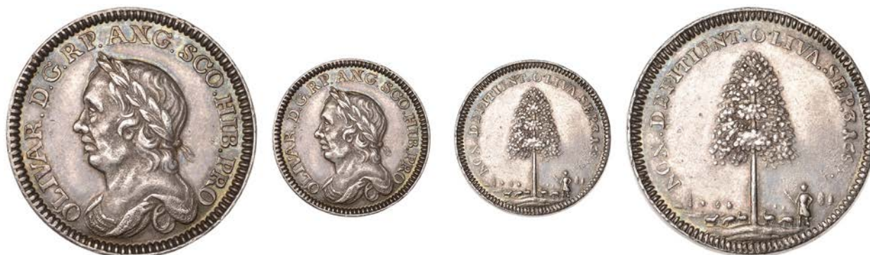
73 Death of Oliver Cromwell , 1658, a small struck silver medal, late 17th century (?), unsigned (of Dutch origin), after T. Simon, laureate bust left, rev. NON DEFICIENT OLIVA SEP 3 1658, shepherd with his flock under an olive tree, landscape in background, edge plain, 29mm, 11.56g (Lessen, BNJ 1982, dies 2/1; Henfrey pl. v, 4; Platt II, p.26, type B; MI I, 434/84; v. Loon II, 420; E 201). Very fine, toned [slabbed NGC MS 61] £400-£500

Provenance: R. Stucker Collection, Bourgey Auction (Paris), 21 November 1977, lot 70 (part); SNC June 1978 (8429); M. Lessen Collection, Part 4, DNW Auction 186, 21 January 2021, lot 1252