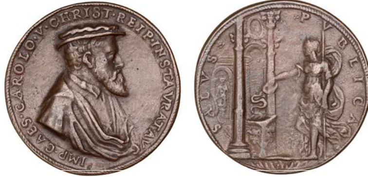
316 HOLY ROMAN EMPIRE, Charles V , a cast bronze medal, unsigned [by L. Leoni], undated, bust right, rev. SALVS PVBLICA, standing female figure holding patera towards snake rising from altar, 48mm (Attwood 21). A later cast, about very fine £100-£120