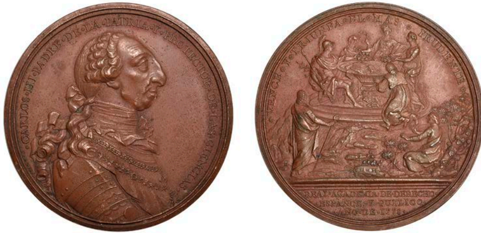
344 MEXICO, Royal Academy of Spanish and Common Law, 1778 , a copper medal by G.A. Gil, armoured bust of Charles III right, rev. table on rocky outcrop surrounded by a group of figures, 58mm (Villena 139). Minor surface pitting, otherwise about extremely fine £200-£260