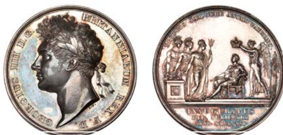
143 George IV, Coronation , 1821, a silver medal by B. Pistrucci, laureate head left, rev. Britannia, Scotia and Hibernia approaching the enthroned King being crowned by Victory, 35mm, 17.02g (BHM 1070; E 1146a). Fields lightly hairlined, otherwise about extremely fine, obverse dark-toned; in contemporary fitted case £240-£300