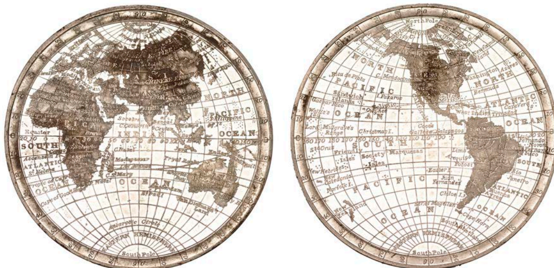
141 Map of the World , a white metal medal, undated (c. 1820), unsigned [by T. Halliday?], map of the Eastern Hemisphere, rev. map of the Western Hemisphere, 74mm (E 1139a). Some minor discolouration, otherwise brilliant extremely fine, rare £400-£500