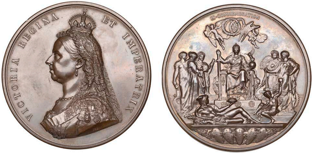
182 Victoria, Golden Jubilee, 1887 , a bronze medal by L.C. Wyon after Sir J.E. Boehm and Sir F. Leighton, similar, 77mm (W & E 2000A.1; BHM 3219; E 1733b). Extremely fine £200-£260