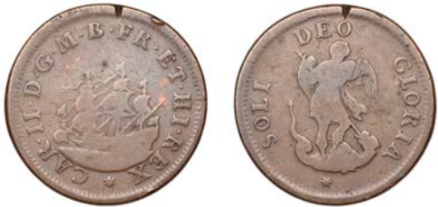
84 Charles II , a copper touchpiece, ship sailing left, rev. St Michael standing, spearing dragon, 30mm, 10.91g/12h (BMC 496). Fine, scarce £100-£120

Anne Clifford, Countess of Dorset, Pembroke and Montgomery (1590-1676)