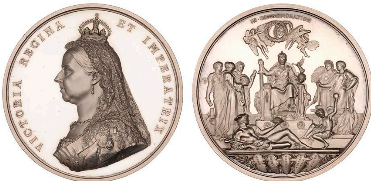
181 Victoria, Golden Jubilee, 1887 , a silver medal by L.C. Wyon after Sir J.E. Boehm and Sir F. Leighton, crowned bust left, rev. enthroned figure of Empire surrounded by standing figures representing Science, Letters, Art, etc, Mercury and Time below, 77mm (W & E 2000A.2; BHM 3219; E 1733b). Of bright appearance, fields prooflike but lightly hairlined, good extremely fine; in case of issue £1,000-£1,200