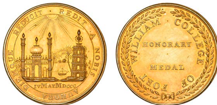
319 INDIA, College of Fort William (Est. 1800), Honorary Medal, type III, a gold award, unsigned, mosque and pagoda, rev. legend within wreath, 45mm, 48.60g (Pudd. 800.3). A few minor marks, about extremely fine and toned, very rare £4,000-£5,000