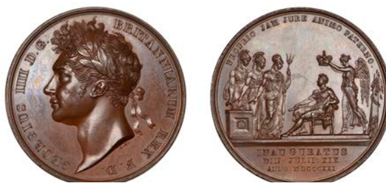
144 George IV, Coronation , 1821, a copper medal by B. Pistrucci, similar, 35mm (BHM 1070; E 1146a). Better than extremely fine, in contemporary fitted shagreen case £100-£120