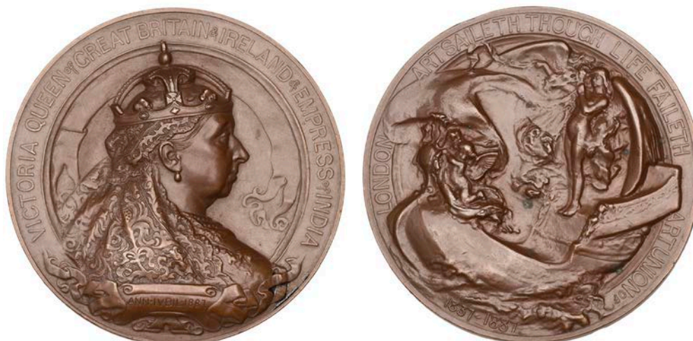
184 Victoria, Golden Jubilee, 1887 , a bronze medal, unsigned [by Sir Alfred Gilbert], for the Art Union of London, crowned bust right, rev. ship sailing left, cherub at prow and angel standing at stern, 63mm (W & E 2150; BHM 3246; E 1735). Reverse edge knock at 11 o'clock, otherwise extremely fine, very rare £800-£900