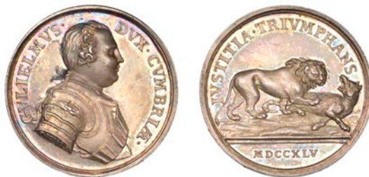
104 The Rebels Retreat to Scotland , 1745, a silver medal by T. Pingo, armoured bust of the Duke of Cumberland right, rev. lion subduing a wolf, 33mm, 13.58g (Eimer 2; Woolf 53:4; MI II, 607/265; E 600). Slight mark on Duke's face, otherwise about extremely fine, peripheral toning over bright fields £240-£300