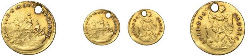
86 James II , a gold touchpiece, ship sailing left, rev. St Michael standing, spearing dragon, 19mm, 1.77g/12h (Woolf O1/R2). Pierced as usual, cleaned, otherwise about very fine, rare £300-£400