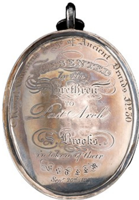
149 Royal Edmund Lodge of Ancient Druids No. 30 , a glazed silver presentation jewel, bust of druid left within double wreath, rev. engraved, named (S. Brooks, Sepr 29th 1827), 75 x 58mm. Obverse brilliant, virtually as made, reverse polished, good very fine; lunettes joined by silver band, with loop and ring for suspension; in contemporary fitted case £200-£260