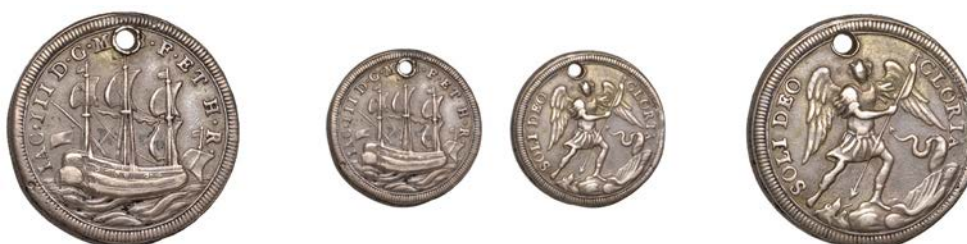
101 James III , a silver touchpiece, ship sailing right, rev. St Michael standing, spearing dragon, 21mm, 4.84g/12h (Woolf 35 [O2/R2]). Pierced as usual, otherwise very fine, scarce £300-£400