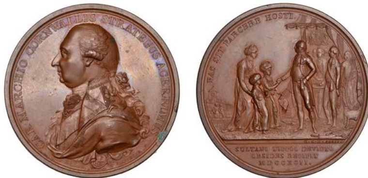
318 INDIA, Defeat of Sultan Tipoo , 1792, a copper medal by C.H. Küchler, uniformed bust of Marquis Cornwallis left, rev. Cornwallis receives the sons of Sultan Tipoo as hostages, 48mm (Pudd. 792.1.1; Pollard 5; BHM 363). Extremely fine £300-£400