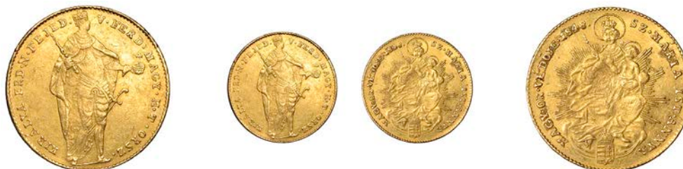
G 1032 Ferdinand V, Ducat, 1848, Kremnitz (Herinek 76; KM. 433; F 227). About very fine