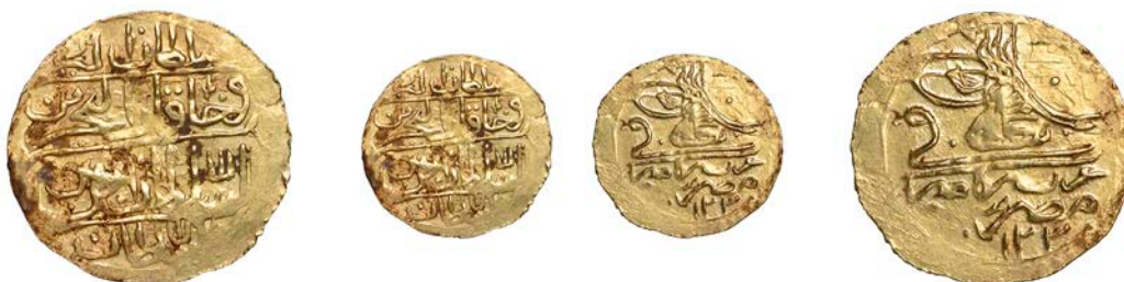
1268 Selim III , Zeri Mahbub, Misr 1203h, ba , 2.63g/12h (Lec. 24; KM 152; ICV 3445). Some minor weakness, otherwise good very fine, very rare £1,000-£1,200

Struck during the French occupation of Egypt; the letter ba is believed to stand for Bonaparte.