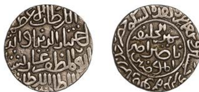
x 1037 Ikhtiyar al-din Ghazi , Tanka, Hadrat Jalal Sunargaon 753h, 10.67g/8h (GG B138; ICV –). A few test-marks on reverse, good very fine, rare £300-£400