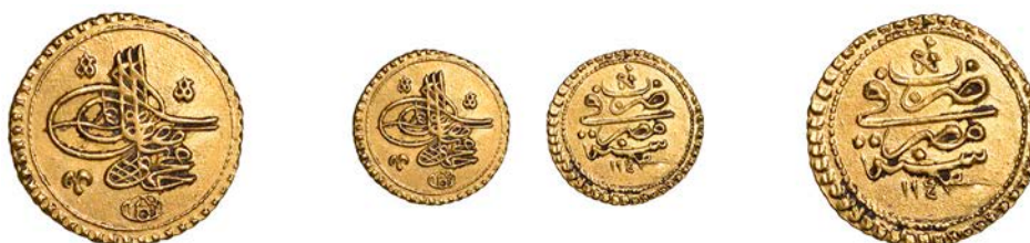
1237 Mahmud I, Findik, Misr 1143h, 3.46g/12h (OC 24-039; ICV 3313). Good very fine