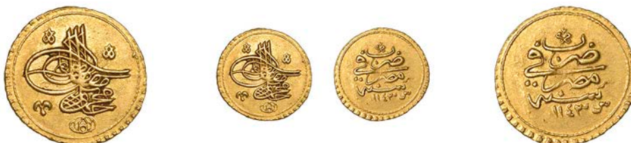
1240 Mahmud I , Findik, Misr 1143h, sin, 3.43g/12h (OC 24-039; ICV 3313). Small file-mark on edge, otherwise good very fine £200-£260