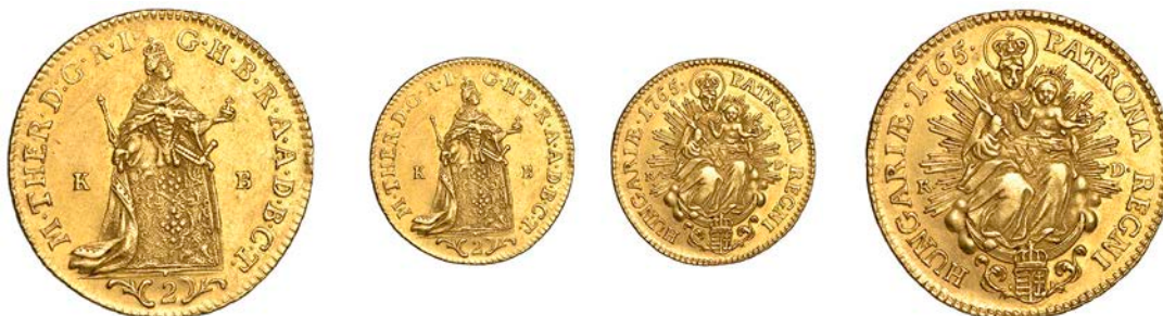
1030 Maria Theresa, 2 Ducats 1765кв, Kremnitz, KD in rev. field (Her. 62; Husz. 1648; F 180). Good very fine