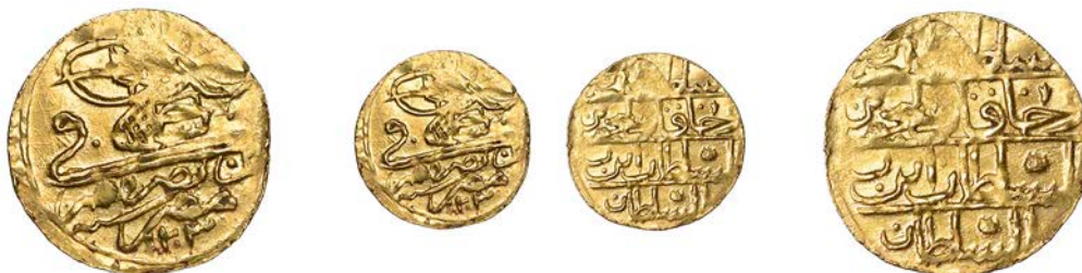
1265 Selim III , Zeri Mahbub, Misr 1203h, ba , 2.43g/12h (Lec. 24; KM 152; ICV 3445). About extremely fine, very rare £1,200-£1,500

Struck during the French occupation of Egypt; the letter ba is believed to stand for Bonaparte.