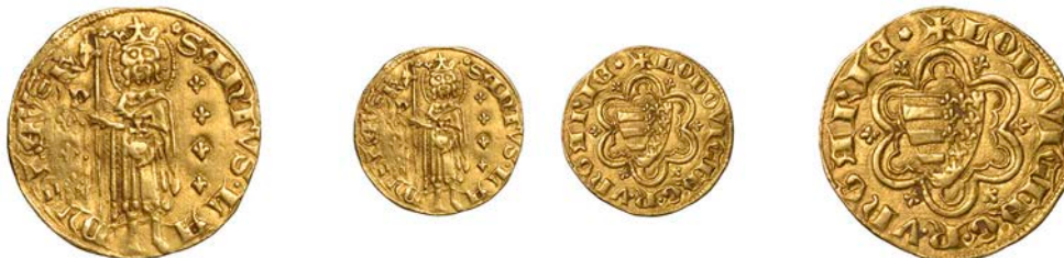
1014 Louis I of Anjou (1342-82), Goldgulden, Buda, c. 1364-72, mm. p and lis, 3.48g/1h (Pohl B4-1; Huszar 514; F 5). Nearly very fine £600-£800