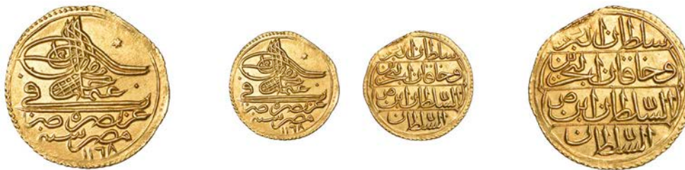
1245 Osman III , Zeri Mahbub, Misr 1168h, sad , 2.58g/12h (OC 25-017-02; ICV 3347). About extremely fine £150-£180