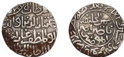
x 1036 Ikhtiyar al-din Ghazi , Tanka, Hadrat Jalal Sunargaon 752h, 10.93g/11h (GG B138; ICV –). Minor staining, otherwise good very fine, rare £300-£400