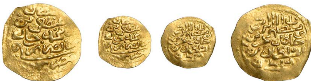
1230 Mustafa II , Sultani, Misr, date (1106h) unclear, 3.37g/11h (OC 22-021; ICV 3252). Peripheral weakness, otherwise very fine, rare £300-£400