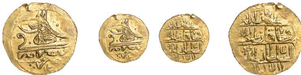
1260 Selim III , Zeri Mahbub, Misr 1203h, sad , 2.57g/12h (OC 28-028; ICV 3445). Peripheral weakness, small edge flaw, graffiti in obverse field, otherwise about extremely fine £120-£150