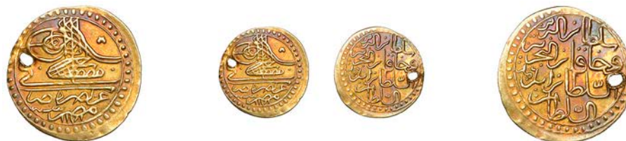
1247 Mustafa III , Half-Zeri Mahbub, Misr 1171h, yr 6, mim dal , 1.24g/11h (OC 26-034-01; ICV 3370). Holed, otherwise very fine and toned, rare £120-£150