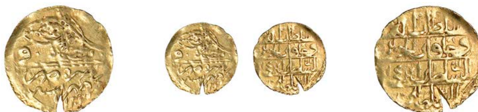
1264 Selim III , Half-Zeri Mahbub, Misr 1203h, yr 14, 1.27g/1h (OC p.224; KM 151; ICV 3446). Edge split, otherwise about very fine, very rare £400-£500