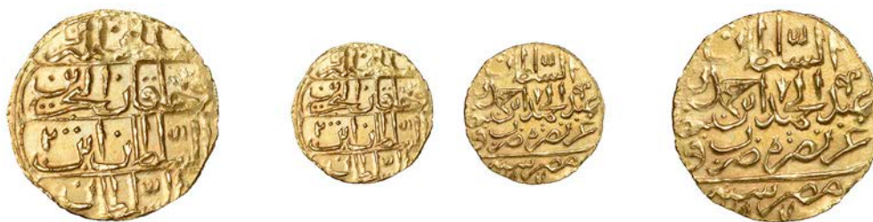
1257 Abdul Hamid I, Zeri Mahbub, Misr 1187h, yr '200', 2.55g/12h (OC 27-030-03; ICV 3412). File-mark on edge, otherwise about extremely fine, scarce