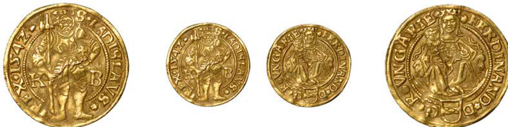
1023 Ferdinand I, Ducat, 1542 KB , Kremnitz, 3.53g/11h (Husz. 895; F 48). Slightly creased and with internal crack, very fine £300-£400