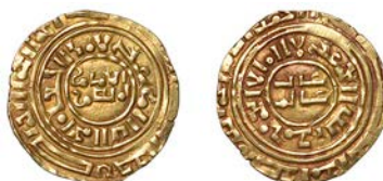
944 JERUSALEM, Anonymous, Bezant, imitating a dinar of the Fatimid caliph al-Amir, legends blundered, 3.26g/7h (A 730). Very fine £200-£260