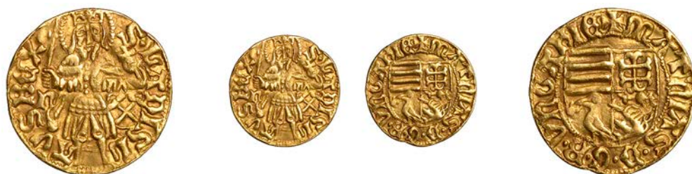
1021 Matthias Corvinus (1458-90), Goldgulden, undated, c. 1468-9, Nagybanya, mm. n and shield with crossed hammers, 3.45g/4h (Pohl K1-22; Huszar 674). Nearly very fine £500-£600