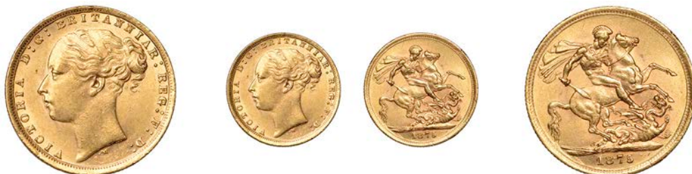
G 885 Victoria , Sovereign, 1875M (M 97; S 3857). Good very fine £300-£400