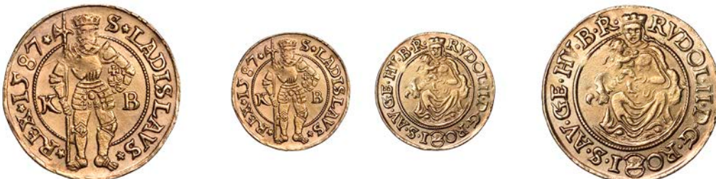
1024 Rudolph II, Ducat, 1587 KB , Kremnitz, 3.50g/1h (Husz. 1002; F 63). Possibly removed from a mount, cleaned (or gilt?), very fine £240-£300