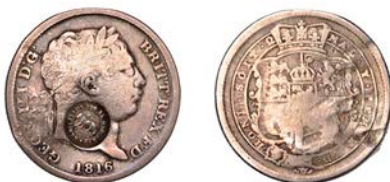
940 Republic, countermarked coinage, 2 Reales, a George III Shilling, 1816, with type VI countermark (KM 93). Coin scratched otherwise fine, countermark good very fine, scarce £100-£120