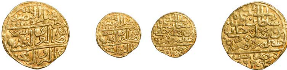
1210 Suleyman I, Sultani, Misr 926h, 3.48g/12h (Artuk Suleyman 154; A 1317; ICV 3158). Very fine