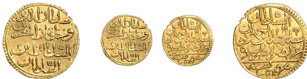
1253 Abdul Hamid I , Zeri Mahbub, Misr 1187h, yr 2, 2.58g/12h (OC 27-030-03; ICV 3412). Lustrous extremely fine £150-£180