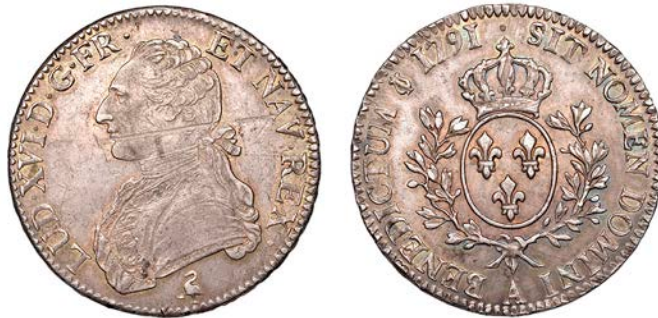
967 Louis XVI , Écus aux branches d'olivier, 1791A (Dup. 1708; Gad. 356). Extremely fine and lightly toned but scored across face £100-£120