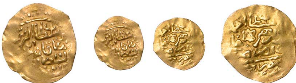
1229 Ahmed II , Sultani, Misr, date (1102h) unclear, 3.41g/1h (OC 21-006; ICV 3239). Wavy flan, partly flat, otherwise very fine, scarce £200-£260