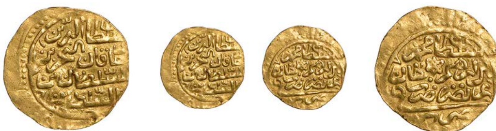
1225 Mehmed IV, Sultani, Misr, date (1058h) unclear, 3.39g/4h (A 1383; ICV 3216). Struck slightly off-centre, about very fine