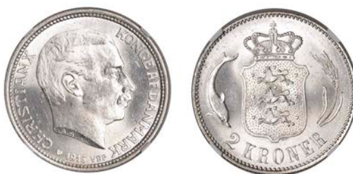
955 Christian X , 2 Kroner, 1916 VBP , Copenhagen (Hede 8; KM 820). About as struck [certified and graded by NGC as MS 64] £150-£180