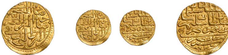
1213 Suleyman I, Sultani, Misr 926h, 3.54g/2h (Artuk Suleyman 150; A 1317; ICV 3158). Extremely fine