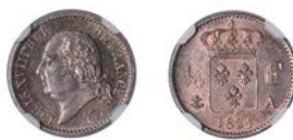
970 Louis XVIII , Quarter-Franc, 1824A, Paris (Gad. 352; KM 714.1). Toned, good extremely fine [certified and graded by NGC as MS 63] £120-£150