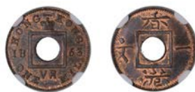
1012 Victoria , Mil, 1863 (Prid. 193; KM 1). Extremely fine with traces of original colour [certified and graded by NGC as MS 64 BN] £120-£150