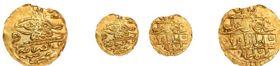
1263 Selim III , Half-Zeri Mahbub, Misr 1203h, uncertain mintmark, 1.31g/11h (OC 28-029 var.; ICV 3446). Minor edge damage, otherwise about extremely fine, rare £120-£150

Struck during the French occupation of Egypt; the letter ba is believed to stand for Bonaparte.