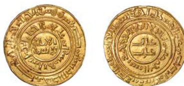
943 JERUSALEM, Anonymous, Bezant, imitating a dinar of the Fatimid caliph al-Amir, with mintname Misr (Egypt), undated, 3.81g/1h (A 730). About extremely fine £300-£400