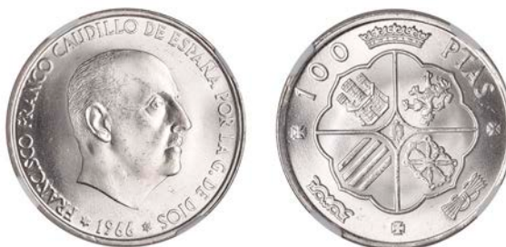
x 1158 Franco , 100 Pesetas, 1966 (69), straight 9 in star (Cayón 17893; KM 797). About as struck [certified and graded by NGC as MS 64]