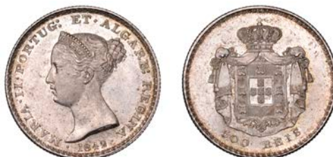
1122 Maria II , 500 Réis, 1842 (Gomes 31.05; KM. 471). About as struck, lustrous [Graded NGC MS 64+]