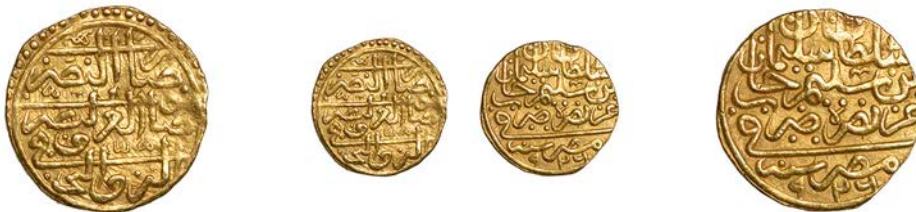
1212 Suleyman I, Sultani, Misr 926h, 3.51g/9h (Artuk Suleyman 151; A 1317; ICV 3158). Good very fine