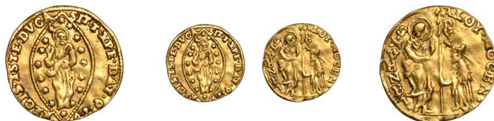
1075 VENICE, Alvise II Mocenigo (1700-09), Zecchino, 3.31g/1h (Paolucci 2; F 1358). Possibly removed from a ring-mount, otherwise nearly very fine £180-£220