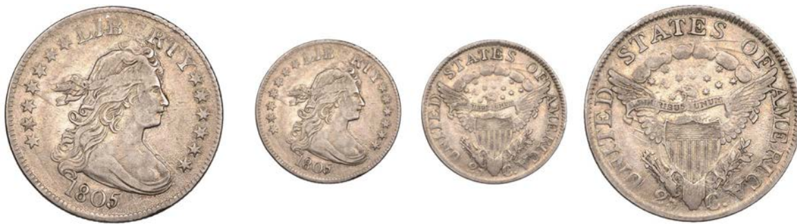
1189 Quarter-Dollar, 1805. Rim mark at 11 o'clock reverse, otherwise better than very fine, rare