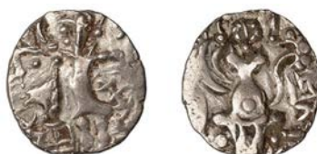
1035 KIDARITE, Tarapira (5th century AD), base gold Stater, 7.62g/12h (Mitchiner ACW 3637). Minor deposit, otherwise very fine, rare £150-£180