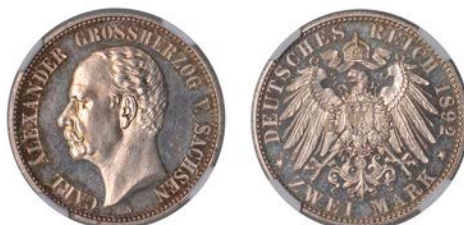
992 SAXE-WEIMAR-EISENACH, Carl Alexander, Proof 2 Marks, 1892 A , 11.13g/12h (cf. KM Y212). About as struck, rare [certified and graded by NGC as PF 63 CAMEO] £1,000-£1,200