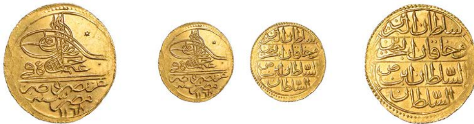
1244 Osman III , Zeri Mahbub, Misr 1168h, 'ayn on obv. , sad on rev. , 2.58g/12h (OC 25-017-02; ICV 3347). Extremely fine £200-£260