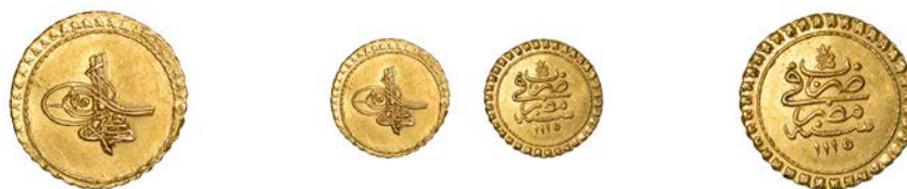
1233 Ahmed III, Half-Findik, Misr 1115h, 1.73g/12h (OC 23-045; ICV 3276). About extremely fine, very rare