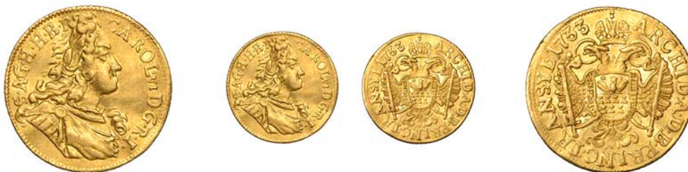
1034 TRANSYLVANIA, Charles VI , Ducat, 1733, Karlsburg (Her. 217; Husz. 5897; F 520). Lightly creased, about very fine £300-£400 Provenance: Morton and Eden Auction 83-4, 1 December 2016, lot 1136