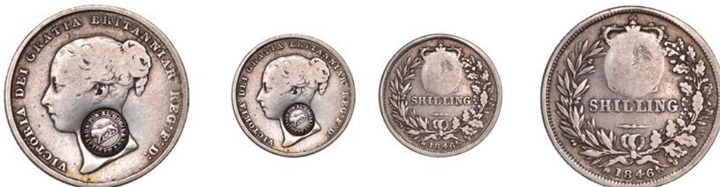
941 Republic, countermarked coinage, 2 Reales, a Victoria Shilling, 1846, with type VI countermark (KM 94). Coin fine, countermark very fine, scarce £120-£150