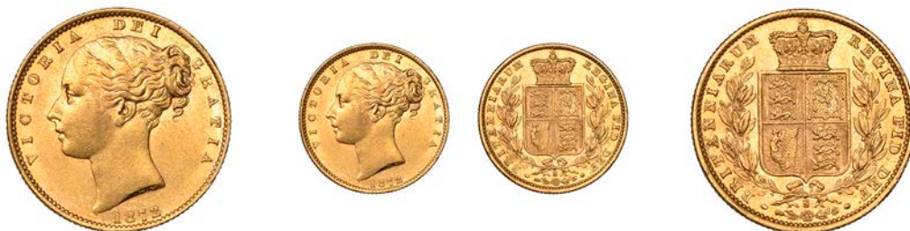
G 884 Victoria , Sovereign, 1872s, shield rev. (M 70; S 3855). Lightly bagmarked, good extremely fine £500-£600