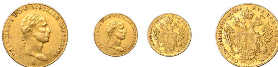
G 1031 Francis I, Ducat, 1835в, Kremnitz (Herinek 186; Jaeger 216; F 218; KM. 2172 [Austria]). Good very fine, reverse better