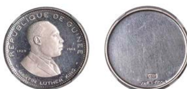
1009 Republic , 100 Francs, [1969], a uniface trial strike of the obv. in silvered-brass (cf. KM 9). Virtually as struck, very rare [certified and graded by NGC as PF 64 Ultra Cameo] £200-£260