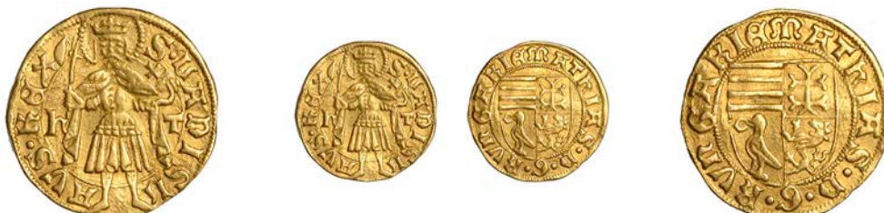
1019 Matthias Corvinus (1458-90), Goldgulden, undated, c. 1460, Sibiu (Hermannstadt), mm. n and τ, 3.44g/10h (Pohl K3; Huszar 673). Slightly creased, about very fine £400-£500