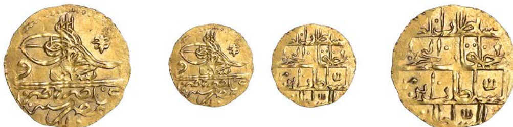
1267 Selim III , Zeri Mahbub, Misr 1203h, sad , 2.57g/12h (OC 28-028; ICV 3445). Minor peripheral weakness, about extremely fine

Struck during the French occupation of Egypt; the letter ba is believed to stand for Bonaparte.