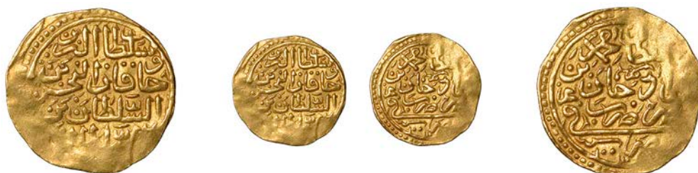
1220 Mehmed III, Sultani, Misr 1003h, 3.43g/2h (Pere 323; A 1340.2; ICV 3179). Weak in parts, otherwise very fine