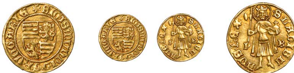
1015 Sigismund (1387-1437), Goldgulden, undated, c. 1410 (?), Pecs (?), mm. p and b, 3.48g/2h (Pohl D2-51; Huszar 573). Very fine £500-£700