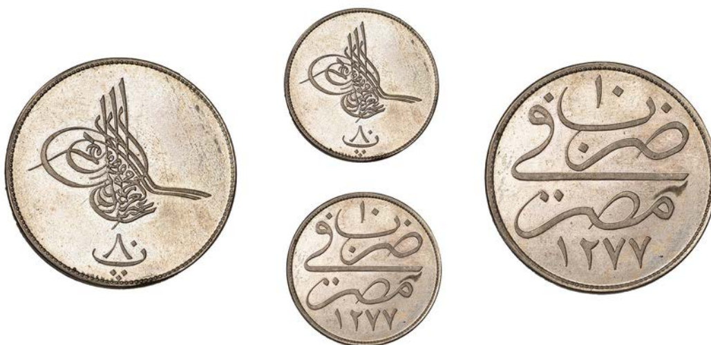
956 Abdul Aziz , Piedfort Pattern 80 Para, struck in copper-nickel, Misr 1277h, yr 10, edge plain, 16.86g/12h (OC 32-044-01; KM PA1). Brilliant, about as struck, extremely rare £1,000-£1,200