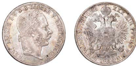
895 Franz Joseph I , Thaler, 1866 B (Dav. 26; KM 2245). Some contact marks, otherwise about extremely fine £150-£180