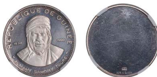
1008 Republic , 200 Francs, [1969], a uniface trial strike of the obv. in silvered-brass (cf. KM 11). Virtually as struck, very rare [certified and graded by NGC as PF 66 Ultra Cameo] £240-£300