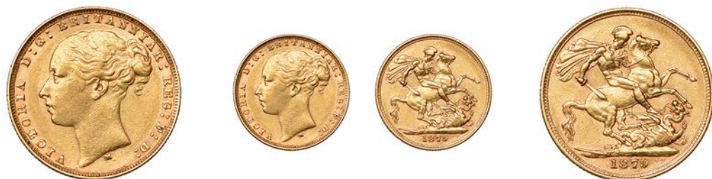
G 886 Victoria , Sovereign, 1879M (M 101; S 3857). Very fine £300-£400