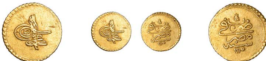
1231 Ahmed III , Findik, Misr 1115h, 3.43g/12h (OC 23-041; ICV 3275). About very fine £150-£180