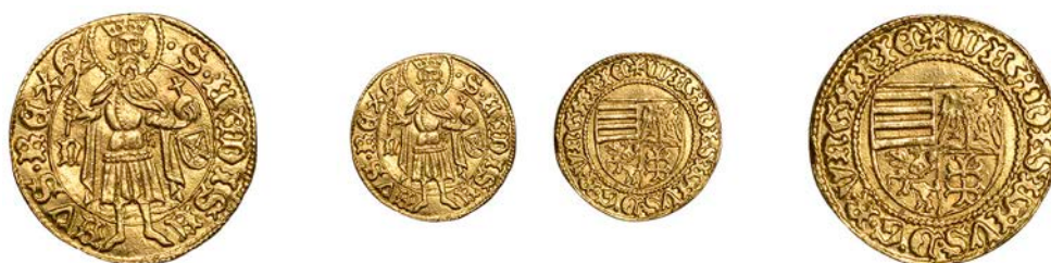
1017 Ladislaus I Jagiello (1440-53), Goldgulden, undated, c. 1443-4, Nagybanya, mm. n and shield, 3.36g/5h (Pohl F1-11; Huszar 597). Cleaned and edge partly smoothed, very fine £400-£600