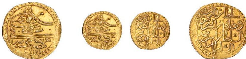
1248 Mustafa III , Zeri Mahbub, Misr 1171h, yr 6, mim dal , 2.59g/12h (OC 26-033-02; ICV 3369). Small edge split, otherwise good very fine £120-£150