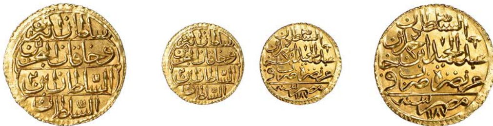
1256 Abdul Hamid I, Zeri Mahbub, Misr 1187h, yr 2, 2.58g/12h (OC 27-030-03; ICV 3412). Good extremely fine