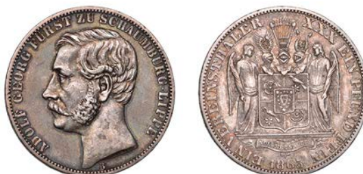
993 SCHAUMBURG-LIPPE, Adolf Georg, Thaler, 1865 B (Dav. 910; KM 47). Very fine, scarce £100-£120