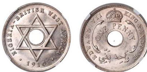
912 Edward VII, Penny, 1910 (Vice 15; KM 2). About as struck [certified and graded by NGC as MS 64] £100-£120