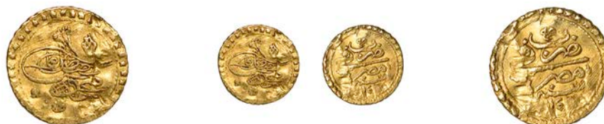
1242 Mahmud I , Half-Findik, Misr 1143h, 1.72g/12h (OC 24-045; ICV 3314). Scratched on both sides, other surface marks, otherwise very fine, rare £100-£120