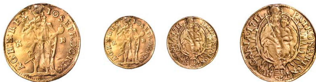
1027 Joseph I, Ducat, 1711 KB , Kremnitz (Her. 57; Husz. 1561; F 164). Pierced, plugged and mount removed at 12 o'clock, surfaces sweated, fine, very rare £400-£600

Of the six specimens sold since 2018 (mostly extremely fine), all fetched in excess of €10,000 including premium.