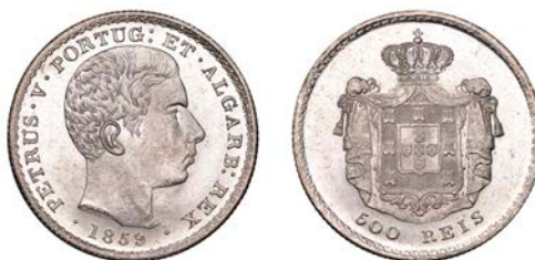
1123 Peter V , 500 Reis, 1859 (Gomes 08.03; KM. 498). About as struck, lustrous [Graded NGC MS 65]