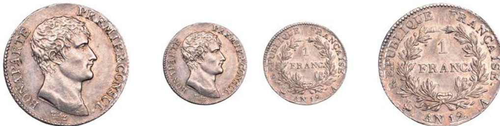
969 Napoleon (as First Consul), Franc, AN 12A, Paris, 4.99g/6h (Gad. 442; KM 649.1). Lightly cleaned, otherwise about extremely fine with some toning £150-£180