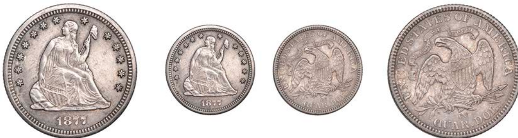
1190 Quarter Dollar, 1877cc. Extremely fine or better, lightly toned