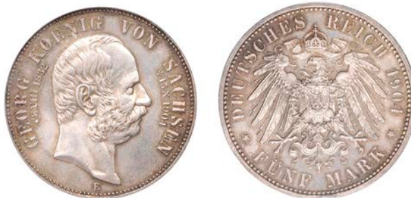
991 SAXONY, Georg, 5 Mark, 1904 E (Dav. 904; KM 1262). About as struck with some toning [certified and graded by CGS as UNC 85] £150-£180