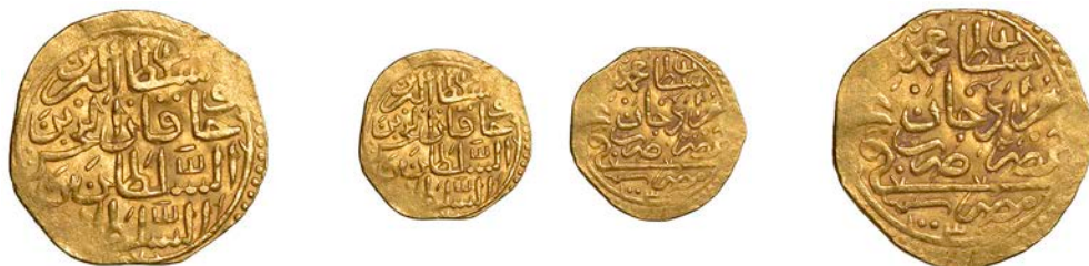
1221 Mehmed III, Sultani, Misr 1003h, 3.50g/7h (Pere 323; A 1340.2; ICV 3179). Very fine