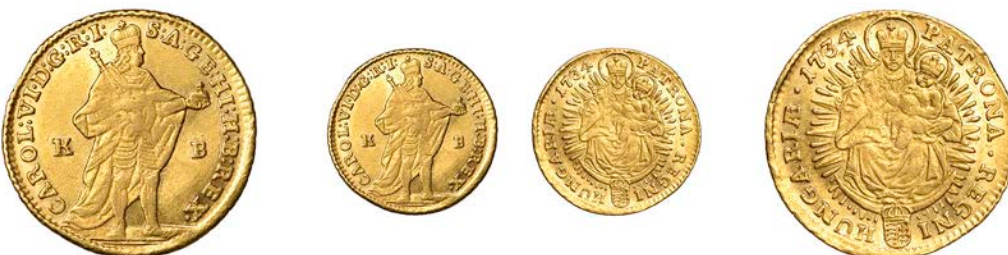
1028 Charles VI, Ducat, 1734 KB , Kremnitz (Her. 161; Husz. 1586; F 171). About extremely fine £500-£600

Of the six specimens sold since 2018 (mostly extremely fine), all fetched in excess of €10,000 including premium.