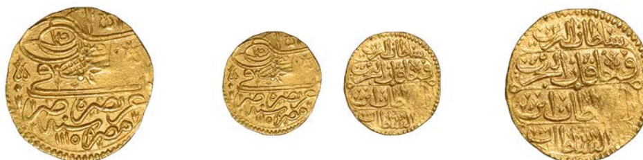
1236 Ahmed III, Ashrafi, Misr 1115h, mim , 3.51g/5h (OC 23-035; ICV 3277). Weak area on each side, light scratches on reverse, otherwise very fine, scarce