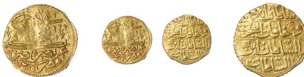
1234 Ahmed III, Ashrafi, Misr 1115h, 3.50g/3h (OC 23-035; ICV 3277). Weak area on obverse, otherwise very fine, scarce