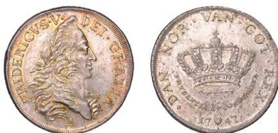
952 Frederik V, Krone, 1747A, Copenhagen, 18.07g/12h (Hede 29B; KM 560). Lightly cleaned at one time, otherwise about extremely fine with some toning