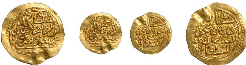
1223 Mehmed IV, Sultani, Misr, date (1058h) unclear, 3.47g/8h (A 1383; ICV 3216). Weak in parts, otherwise very fine