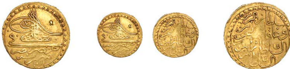
1250 Mustafa III , Zeri Mahbub, Misr 1171h, uncertain mintmark, 2.57g/12h (OC 26-033-02; ICV 3369). Slightly bent, otherwise very fine £120-£150