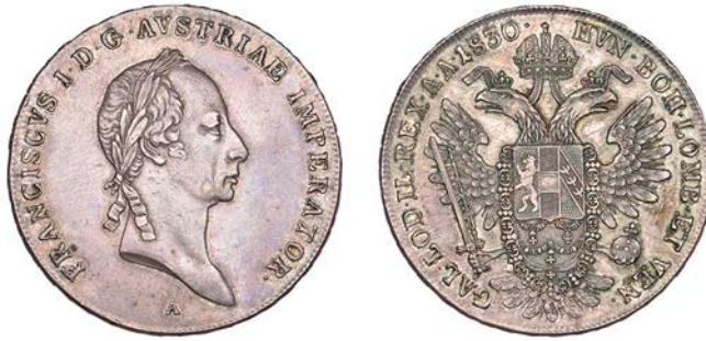
894 Franz I , Thaler, 1830 A (Voglhuber 308; Dav. 9; KM 2163). Lightly cleaned at one time, otherwise good very fine £100-£120