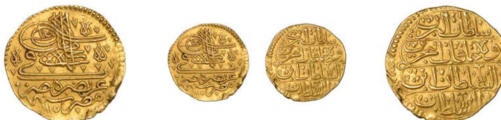
1235 Ahmed III, Ashrafi, Misr 1115h, 3.46g/12h (OC 23-035; ICV 3277). Some minor marks, otherwise very fine, scarce