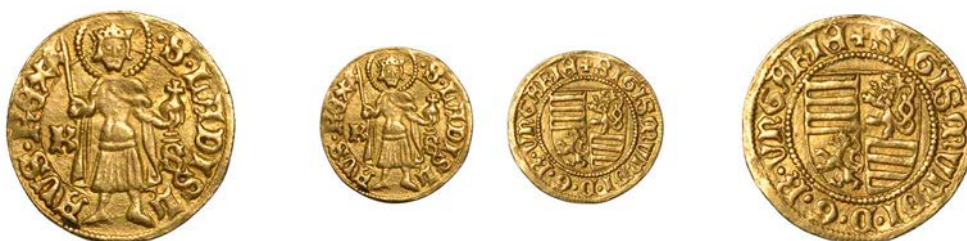
1016 Sigismund (1387-1437), Goldgulden, undated, c. 1431-7, Kremnitz, mm. κ and s, 3.56g/3h (Pohl D2-34; Huszar 573; F 10). Edge perhaps lightly smoothed, about very fine £400-£500