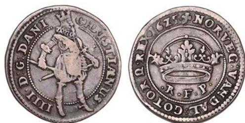
950 Christian IV, Krone, 1625, 18.42g/12h (Hede 127). About very fine