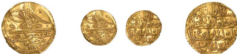
1241 Mahmud I , Half-Zeri Mahbub, Misr 1143h, 'ayn, 1.30g/12h (OC 24-043-01; ICV 3316). Slightly creased, otherwise good very fine, scarce £120-£150