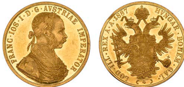
G 896 Franz Joseph I , Four Ducats, 1887 (Frühwald 1136; KM. 2276; F 487). Some light surface marks and hairlines, extremely fine £1,500-£2,000