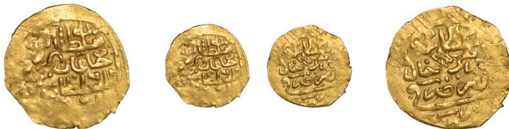
1227 Mehmed IV , Sultani, Misr 1058h, 3.36g/3h (A 1383; ICV 3216). Peripheral weakness, some light scrapes, otherwise about very fine £120-£150