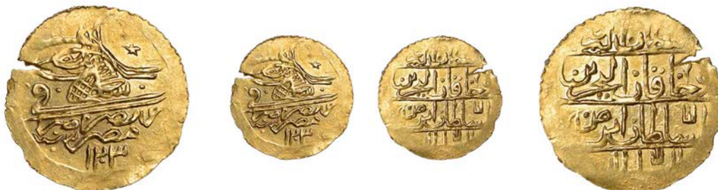
1261 Selim III , Zeri Mahbub, Misr 1203h, sad , 2.56g/12h (OC 28-028; ICV 3445). Edge split, minor peripheral weakness, otherwise extremely fine £150-£180