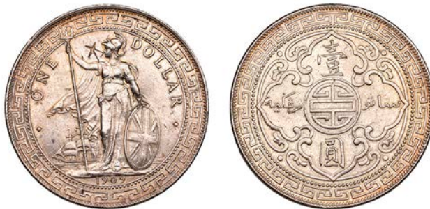
910 Trade Dollar, 1909 B (Prid. 6; KM. T5). Sometime cleaned, a few rim nicks, single chop mark before Britannia's face, extremely fine or better £150-£200