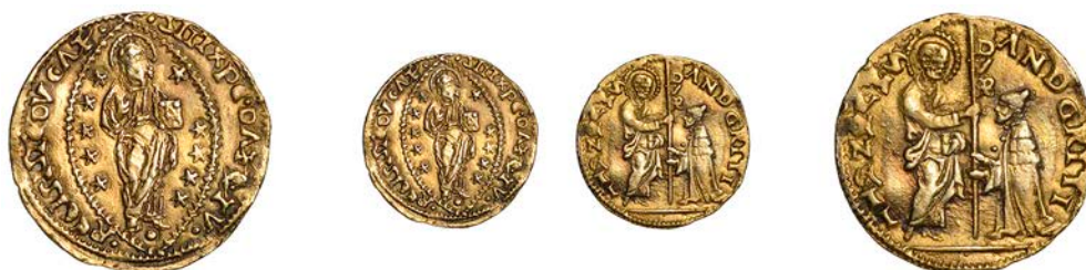
1073 VENICE, Andrea Gritti (1523-38), Ducato, 3.46g/6h (Paolucci 1; Gamb. 272; F 1246). Slight trace of mount at 12 o'clock, otherwise about very fine £180-£220