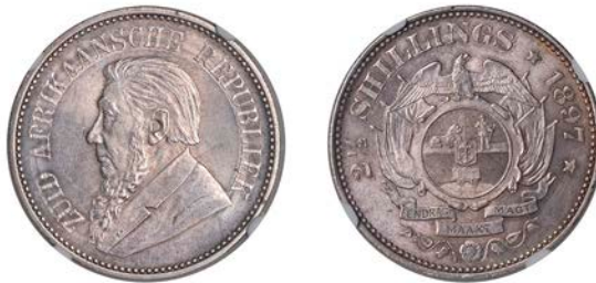
1154 ZAR , Halfcrown, 1897 (Hern Z35; KM 7). Extremely fine [certified and graded by NGC as MS 62]