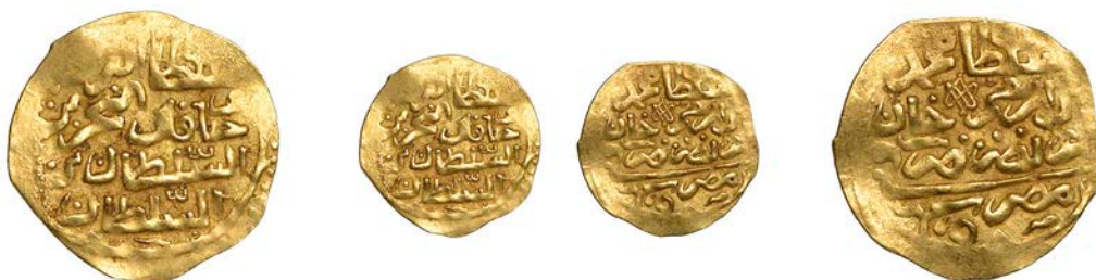
1226 Mehmed IV, Sultani, Misr 1058h, 3.38g/4h (A 1383; ICV 3216). Peripheral weakness, otherwise very fine