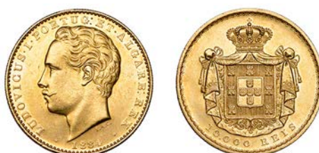
G 1124 Louis I , 10,000 Réis, 1884 (Gomes 17.10; KM 520; F 152). Cleaned, otherwise extremely fine