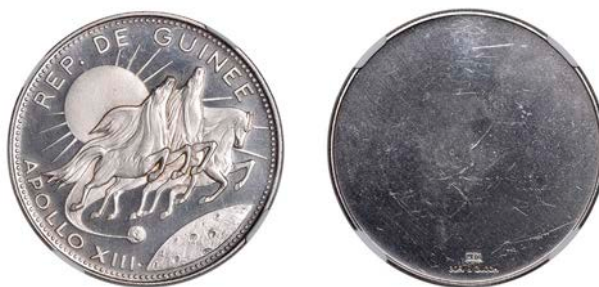
1007 Republic , 250 Francs, [1969], a uniface trial strike of the obv. in silvered-brass (cf. KM 14). Virtually as struck, very rare [certified and graded by NGC as PF 65 Ultra Cameo] £240-£300