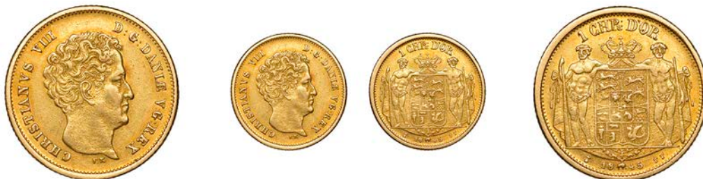
G 954 Christian VIII , Christian d'or, 1845 FF , Altona, 6.61g/12h (Hede 2; KM 730; F 290). Very fine, rare £2,000-£2,600