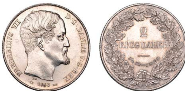
948 Frederik VII, 2 Rigsdaler, 1863rh (KM. 761.3). Extremely fine, lightly toned [Graded NGC MS 61]