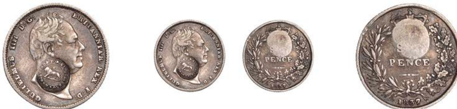
942 Republic, countermarked coinage, Real, a William IV Sixpence, 1837, with type VI countermark (KM 89). Coin about very fine, countermark very fine, rare £150-£180