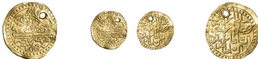
1246 Mustafa III , Half-Zeri Mahbub, Misr 1171h, yr 6, mim sad , 1.23g/11h (OC 26-034-01 var.; ICV 3370). Wavy flan, pierced, otherwise good very fine, rare £120-£150