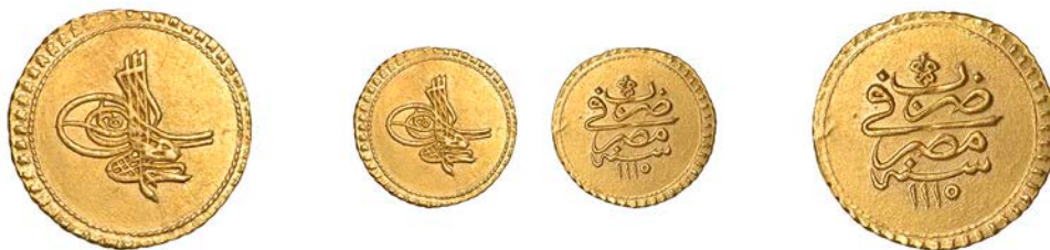
1232 Ahmed III, Findik, Misr 1115h, 3.47g/12h (OC 23-041; ICV 3275). Good very fine