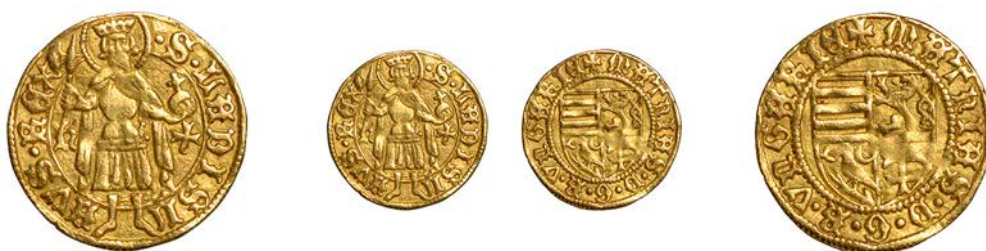
1020 Matthias Corvinus (1458-90), Goldgulden, undated, c. 1463-4, Nagybanya, mm. n and cross, 3.52g/9h (Pohl K1-17; Huszar 674). Nearly very fine £500-£700