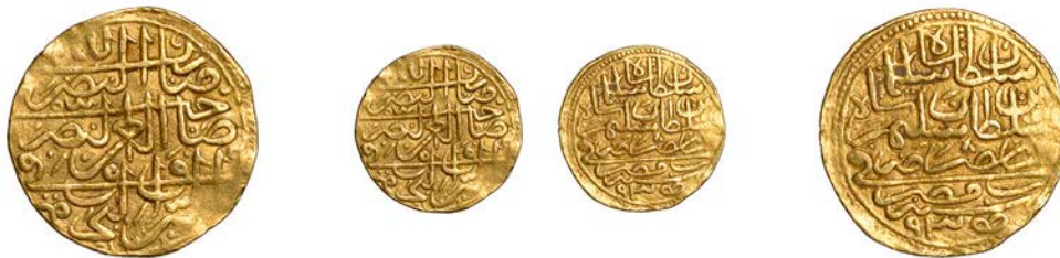
1215 Suleyman I, Sultani, Misr 935h, 3.52g/4h (Artuk Suleyman 163; A 1317; ICV 3158). Very fine, rare