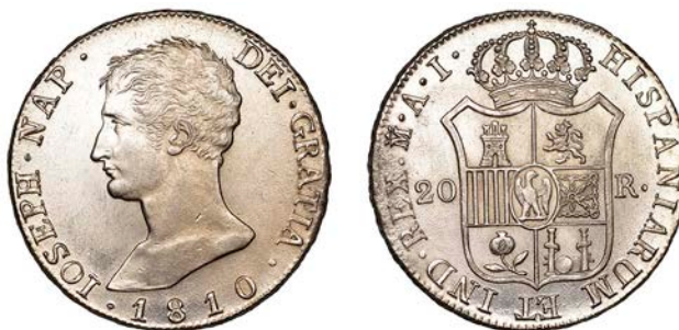
1157 Joseph Napoleon , 20 Reales, 1810 AI , Madrid (CCT 24; Cayón 14706). Lightly cleaned, otherwise extremely fine