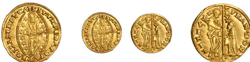
1074 VENICE, Francesco Dona (1545-53), Zecchino, 3.47g/3h (Paolucci 1; F 1250). Very slightly creased, otherwise good very fine £200-£240