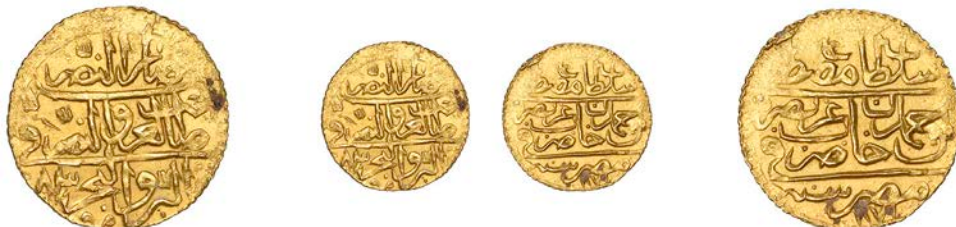
1251 'Ali Bey (rebel) , Zeri Mahbub, Misr (11)83h, 2.65g/12h (OC 26-033-03; ICV 3389). Lightly cleaned, some peripheral weakness, otherwise about extremely fine £150-£180