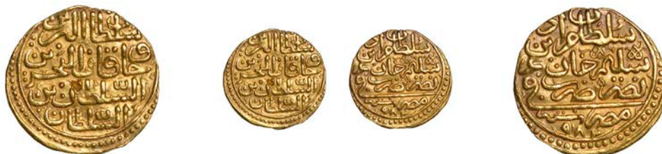
1217 Murad III, Sultani, Misr 982h, 3.48g/12h (Pere 274; A 1332.2; ICV 3173). Test-mark on obverse, file-marks on edge, otherwise good very fine