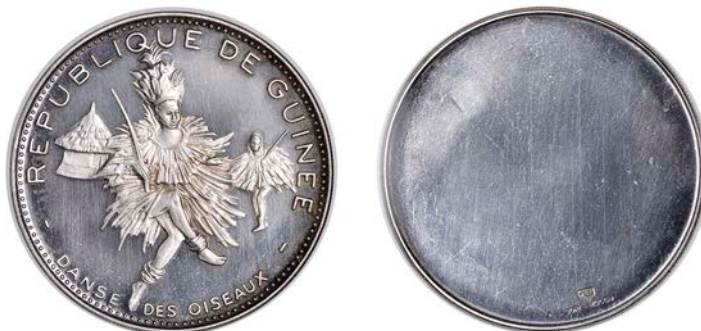
1006 Republic , 500 Francs, [1969], a uniface trial strike of the obv. in silvered-brass (cf. KM 16). Virtually as struck, very rare [certified and graded by NGC as PF 66 Ultra Cameo] £300-£400