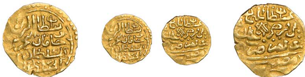
1228 Suleyman II , Sultani, Misr, date (1099h) unclear, 3.46g/9h (OC 20-009; ICV 3230). Minor peripheral weakness, otherwise very fine, rare £300-£400