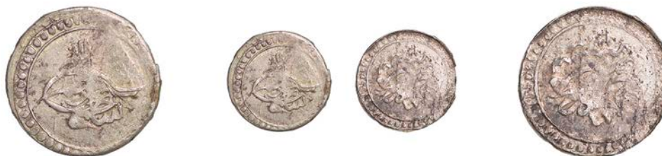
1269 Selim III , 5 Para, Misr 1203h, yr 16, 1.47g/12h (OC 28-034; KM 135; ICV –). Minor surface flaws on reverse, about very fine, very rare £200-£260

Struck during the French occupation of Egypt; the letter ba is believed to stand for Bonaparte.