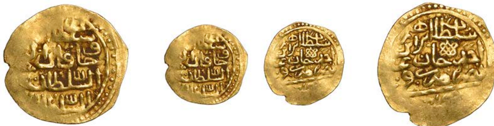
1222 Ibrahim, Sultani, Misr, date (1049h) unclear, 3.41g/8h (Pere 429; A 1376; ICV 3209). Peripheral weakness, otherwise very fine, rare