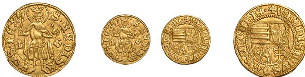
1018 Ladislaus V (1453-8), Goldgulden, undated, c. 1456, Sibiu (Hermannstadt), mm. n and g, 3.43g/12h (Pohl H7-172; Huszar 539). Better than very fine £500-£700