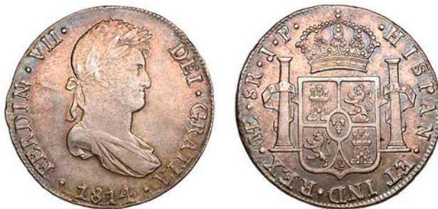
1119 Ferdinand VII , 8 Reales, 1814 JP , Lima (Calicó 1247; KM. 117.1), Die cracks behind head, good very fine, toned Provenance: Bt Baldwin