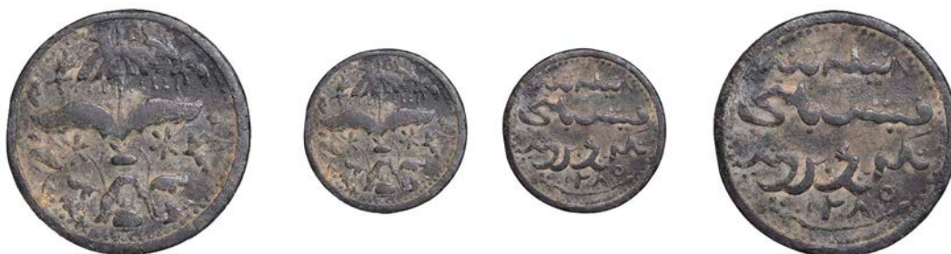
916 temp. 'Abd al-Mu'min, Half-Pitis, 1285 h , 6.29g/6h (Mitchiner 3979; KM 1). Very fine, rare £150-£180