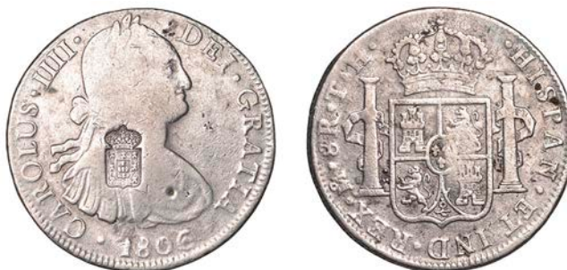
1121 Maria II , 870 Réis, [1834], a Mexico 8 Reales, 1806 TH , countermarked on obv. with crowned Portuguese arms, 26.49g (Gomes 27.42; KM 440.13). Cleaned, coin fine, countermark very fine