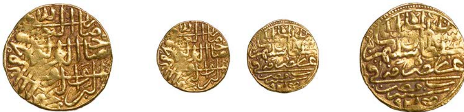
1214 Suleyman I, Sultani, Misr 935h, 3.56g/3h (Artuk Suleyman 163; A 1317; ICV 3158). Obverse double-struck, otherwise very fine, rare