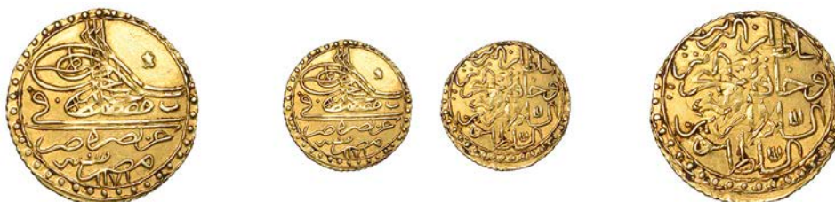
1249 Mustafa III , Zeri Mahbub, Misr 1171h, 2.57g/12h (OC 26-033-02; ICV 3369). Reverse double-struck, otherwise very fine £120-£150