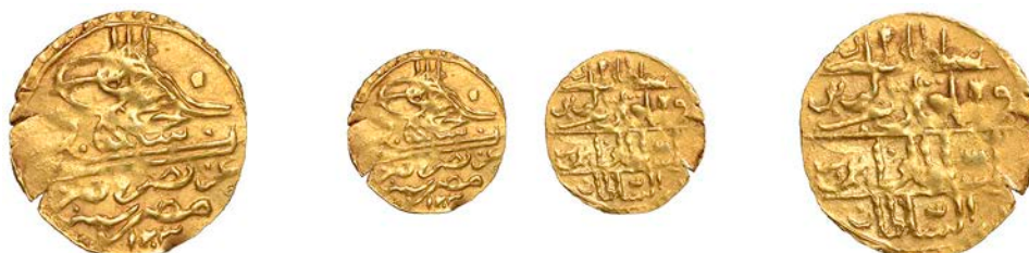
1262 Selim III , Half-Zeri Mahbub, Misr 1203h, ba , 1.28g/12h (Lec. 20; KM 151; ICV 3446). Two edge splits, some minor weakness otherwise very fine, very rare £300-£400

Struck during the French occupation of Egypt; the letter ba is believed to stand for Bonaparte.