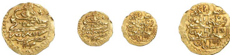
1259 Selim III, Half-Zeri Mahbub, Misr 1203h, ba , 1.29g/11h (Lec. 20; KM 151; ICV 3446). Small edge split, some die-rust, otherwise very fine, very rare