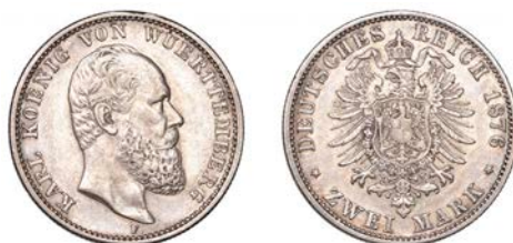
994 WÜRTTEMBERG, Karl I, 2 Mark, 1876 F (KM 626). Good very fine £150-£180