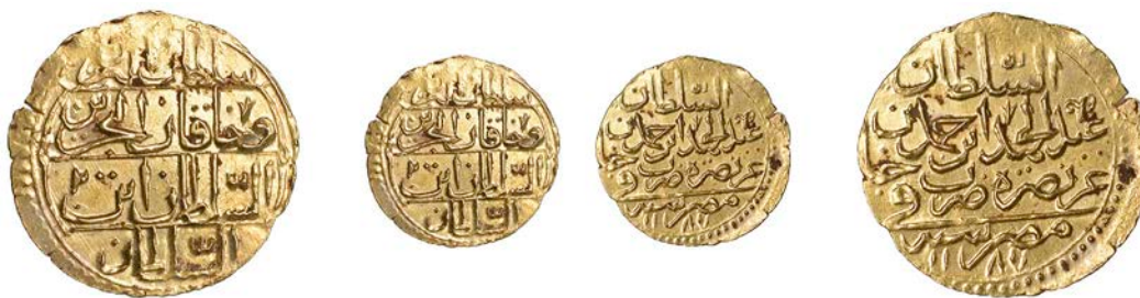
1258 Abdul Hamid I, Zeri Mahbub, Misr 1187h, yr '200', 2.55g/12h (OC 27-030-03; ICV 3412). Extremely fine