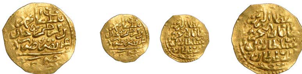
1224 Mehmed IV, Sultani, Misr 1058h, 3.50g/3h (A 1383; ICV 3216). Peripheral weakness, otherwise very fine