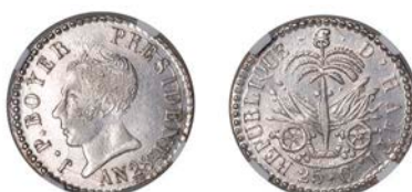
1011 Republic , 25 Centimes, AN 28 [1831] (KM 18.1). Extremely fine [certified and graded by NGC as AU 58] £100-£120