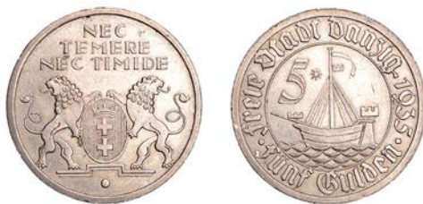
947 Free City, 5 Gulden, 1935 (Kop. 7851; KM 158). Cleaned, otherwise about extremely fine