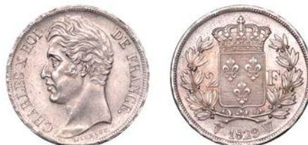
971 Charles X , 2 Francs, 1829w, Lille (Gad. 516; KM. 725.13). Good extremely fine, lightly toned, rare thus £600-£800 Provenance: Maison Palombo Auction 6, 12 October 2008, lot 164