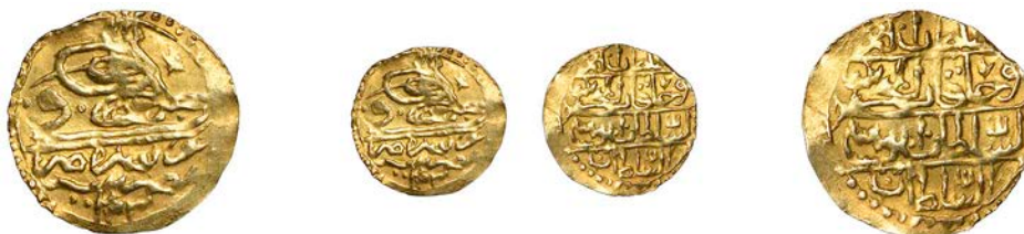
1266 Selim III , Half-Zeri Mahbub, Misr 1203h, ba , 1.27g/11h (Lec. 20; KM 151; ICV 3446). Wavy flan, some die-rust on reverse, otherwise very fine, very rare £300-£400

Struck during the French occupation of Egypt; the letter ba is believed to stand for Bonaparte.