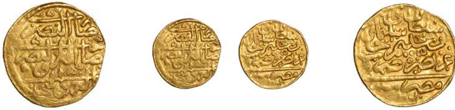
1208 Suleyman I, Sultani, Misr 926h, 3.52g/8h (Artuk Suleyman 151; A 1317; ICV 3158). About very fine