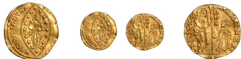
1076 VENICE, Paolo Renier (1779-89), Zecchino, 3.49g/2h (Paolucci 12; Gamb. 1826; F 1434). Wavy flan, reverse slightly off-centre, otherwise good very fine £150-£180