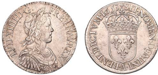
966 Louis XIV , Écu à la mèche longue, 1653A (Dup. 1469; Gad. 202). Good very fine but numerous light adjustment marks on obverse £200-£260