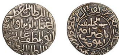
x 1038 Ikhtiyar al-din Ghazi , Tanka, Hadrat Jalal Sunargaon 753h, 10.90g/5h (GG B138; ICV –). Test-mark in centre of reverse, good very fine, rare £300-£400