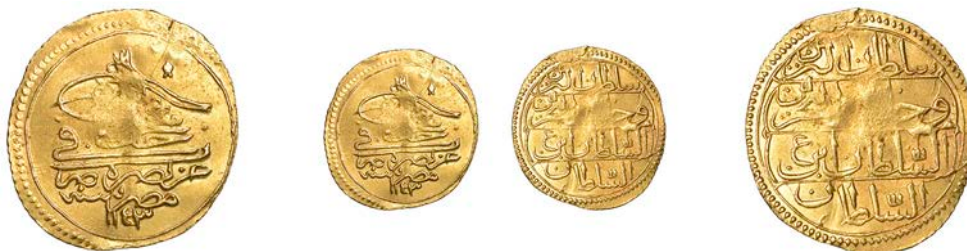
1238 Mahmud I , Zeri Mahbub, Misr 1143h, 'ayn, star to right of toughra, 2.55g/11h (OC 24-042-01; ICV 3315). Centres weak, traces of mounting on edge, otherwise very fine £120-£150