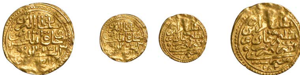
1216 Murad III, Sultani, Misr 982h, 3.32g/4h (Pere 274; A 1332.2; ICV 3173). Weak in parts, minor flan cracks, otherwise very fine