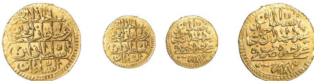
1254 Abdul Hamid I , Zeri Mahbub, Misr 1187h, yr 2, 2.60g/12h (OC 27-030-03; ICV 3412). Extremely fine £150-£180