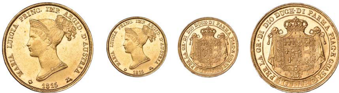
G 1071 PARMA, Maria Luigia, 40 Lire, 1815, 12.90g/6h (MIR 1091/1; KM C32; F 933). Lightly cleaned, otherwise about extremely fine £800-£1,000