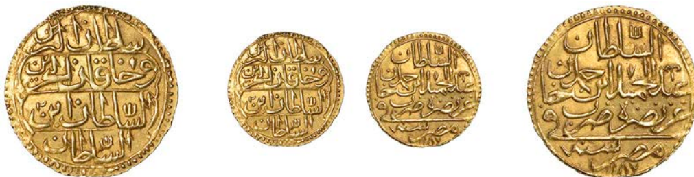
1255 Abdul Hamid I, Zeri Mahbub, Misr 1187h, yr 2, 2.60g/12h (OC 27-030-03; ICV 3412). Extremely fine