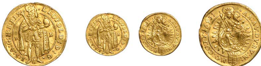
1025 Leopold I, Ducat, 1693 KB , Kremnitz, 3.43g/3h (Her. 359; Husz. 1321; F 128). Traces of mount removal at 12 o'clock, about very fine £300-£400