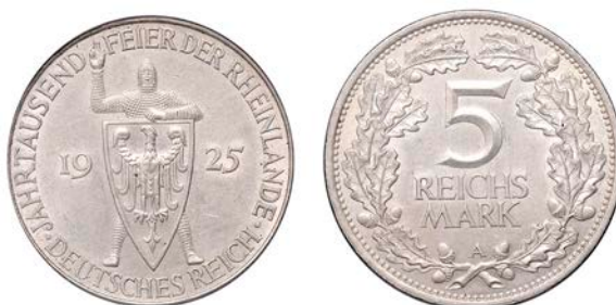
996 WEIMAR REPUBLIC, 5 Reichsmark, 1925 A (Dav. 965; KM 47). Extremely fine [certified and graded by CGS as UNC 85] £100-£120