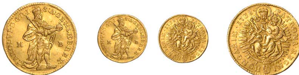
1029 Charles VI, Ducat, 1738кв, Kremnitz (Her. 165; Husz. 1586; F 171). Very fine or better