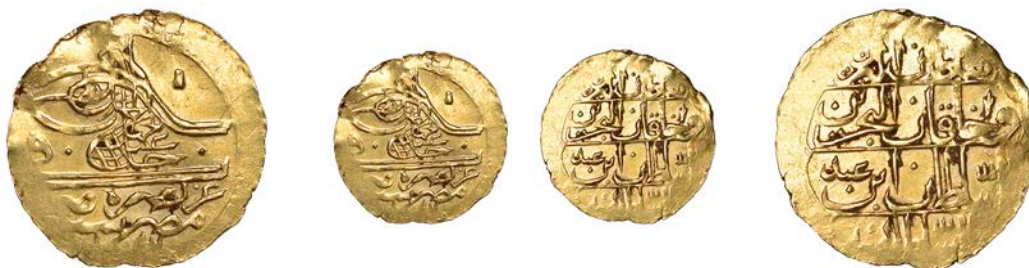
1252 Abdul Hamid I , Zeri Mahbub, Misr 1187h, 'abd, second toughra, 2.56g/12h (OC –; ICV 3412). Peripheral weakness, otherwise about extremely fine, very rare £200-£260