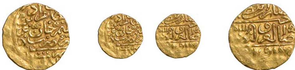
1218 Murad III, Sultani, Misr 982h, 3.31g/9h (Pere 273; A 1332.1; ICV 3173). Some minor weakness, otherwise very fine