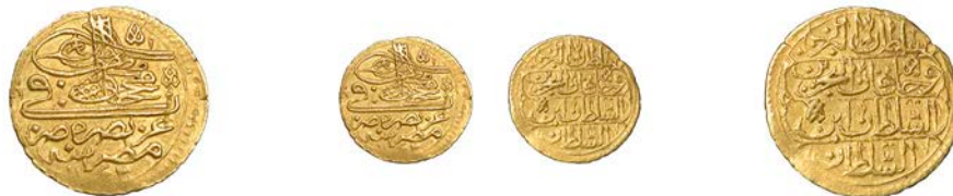
1239 Mahmud I , Half-Zeri Mahbub, Misr 1143h, 1.25g/11h (OC 24-043-01; ICV 3316). Edge crack, otherwise very fine, scarce £100-£120