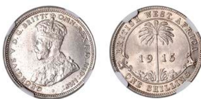
914 George V, Shilling, 1915 H (Vice 43; KM 12). Extremely fine, scarce date [certified and graded by NGC as MS 62] £200-£260