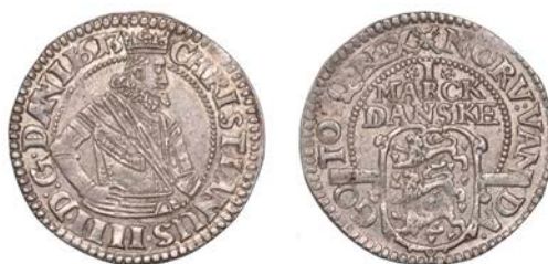
949 Christian IV, Mark, 1613, 8.39g/10h (KM. 52). Extremely fine, traces of lustre