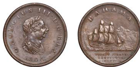
897 George III , Penny, 1806 (Prid. 1; KM. 1). Very fine or better, brown patina, scarce £150-£180