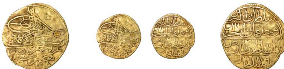
1243 Osman III , Zeri Mahbub, Misr 1168h, 'ayn on obv., sad on rev., 2.58g/12h (OC 25-017-02; ICV 3347). Plugged, fine £120-£150