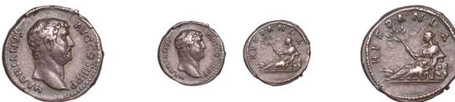
84 Denarius, 130-3, bare-headed bust right, rev. Hispania reclining left, holding olive branch, rabbit at feet, 3.33g (RIC 1535; RSC 822). Very fine or better, toned