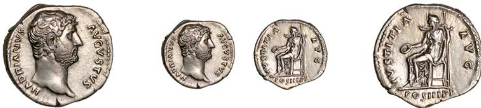
73 Denarius, 129-30, bare-headed bust right, rev. Justitia seated left, holding patera and long sceptre, COS III PP in exergue, 3.40g (RIC 1096; RSC 884). Good very fine and rare £60-£80