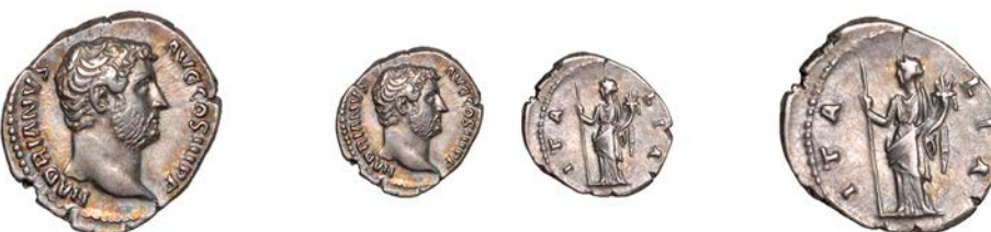
85 Denarius, 130-3, bare-headed bust right, rev. Italia standing left, holding sceptre and cornucopiæ, 3.16g (RIC 1541; RSC 867). Better than very fine