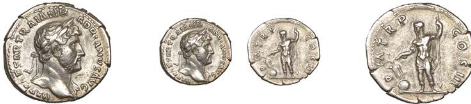
56 Denarius, 121-3, laureate bust right, rev. Hadrian, in military dress, standing left holding inverted spear and rudder set on globe, 3.28g (RIC 567; RSC 1162). Very fine or better £40-£50