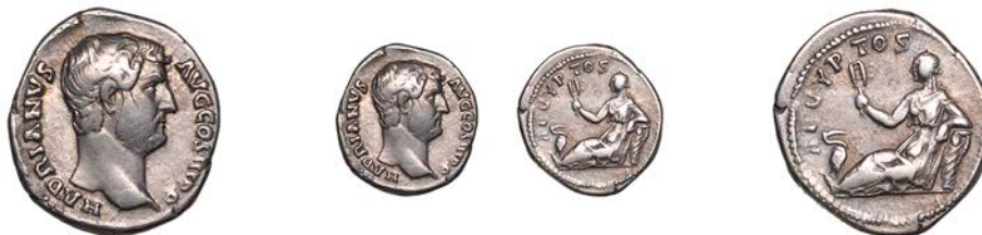
80 Denarius, 130-3, bare-headed bust right, rev. Ægyptos reclining left, holding up sistrum, ibis in front, 3.58g (RIC 1482; RSC 99). About very fine