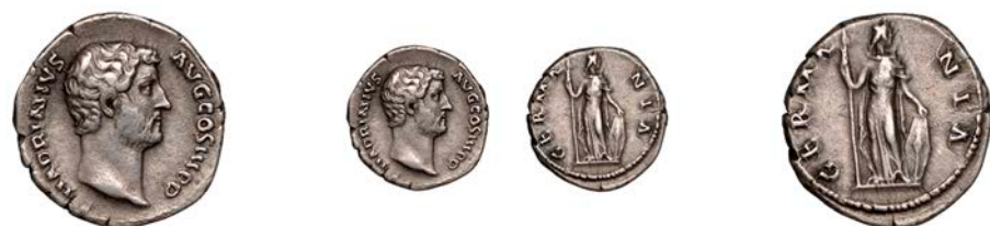
82 Denarius, 130-3, bare-headed bust right, rev. Germania, draped, standing facing, head right, holding vertical spear and resting left hand on oval shield, 2.93g (RIC 1513; RSC 802). Very fine