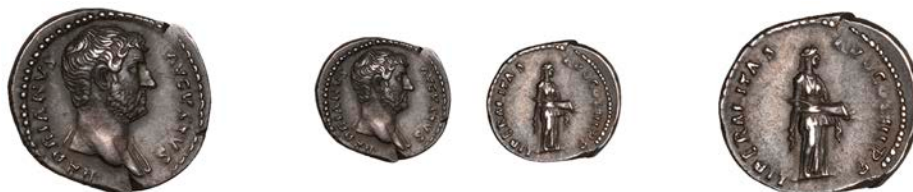
74 Denarius, c. 129-30, bare-headed bust right, slight drapery on far shoulder, rev. Liberalitas standing right, pouring coins from cornucopia, 3.44g (RIC 1101; RSC 920). Good very fine and toned £120-£150