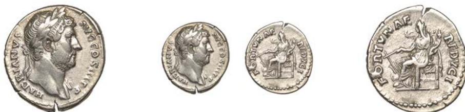
78 Denarius, c. 130, laureate bust right, rev. Fortuna seated left, holding cornucopia and rudder set on globe, 3.46g (RIC 1405; RSC 782). Good very fine £30-£40

Provenance: DNW Auction 52, 28 November 2001, lot 119 (part)