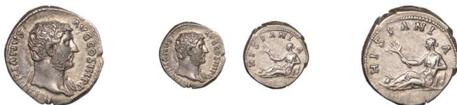
83 Denarius, 130-3, bare-headed bust right, slight drapery on far shoulder, rev. HISPANIA, Hispania reclining left, holding olive branch, rabbit at feet, 3.47g (RIC 1535; RSC 822 var.). Good very fine, lightly toned