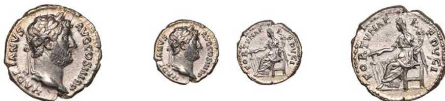
77 Denarius, c. 130, laureate bust right, rev. Fortuna seated left, holding cornucopia and rudder set on globe, 3.04g (RIC 1405; BMC 645-6; RSC 782a). Of bright appearance, good very fine £100-£120

Provenance: DNW Auction 52, 28 November 2001, lot 119 (part)