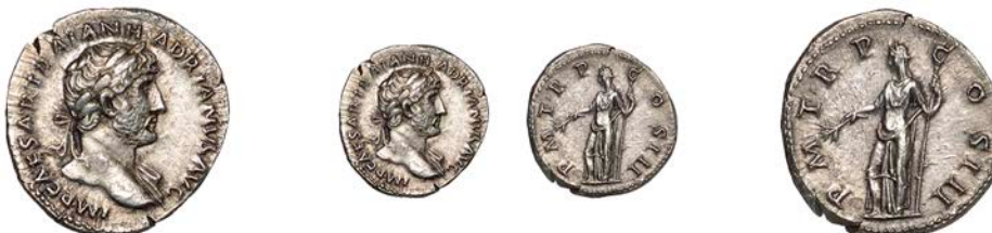
59 Denarius, 119-20, laureate bust right, drapery on far shoulder, rev. Pax standing left, holding olive branch and long sceptre, 3.35g (RIC 223; RSC 1140a). Good very fine £100-£120