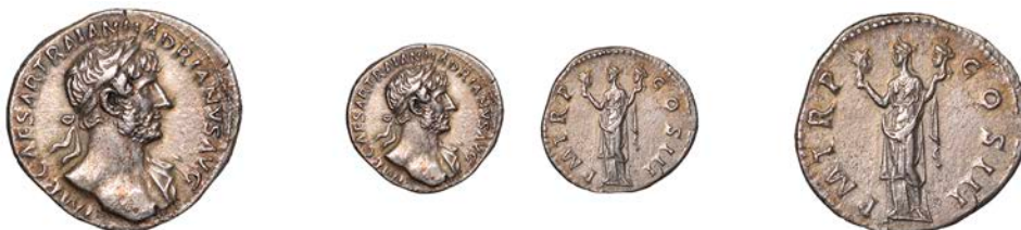
58 Denarius, 119-20, laureate bust right, drapery on far shoulder, rev. Æternitas standing, looking left, holding heads of sun and moon, 3.26g (RIC 125; RSC 1114). Good very fine £90-£120