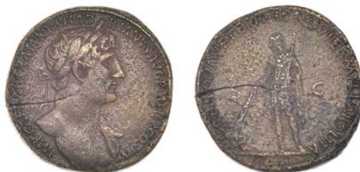
60 Sestertius, c. 120-2, laureate bust right, slight drapery on far shoulder, rev. RELIQUA VETERA HS NOVIES MILL ABOLITA, lictor standing left, holding fasces and lighting pile of records with torch, S C in field, 24.24g (RIC 262; BMC 1206; C 1210). Fine or better but flan cracked and porous, rare £100-£150

The reverse of this remarkable issue commemorates an event initiated by Hadrian to promote his popularity: cancelling debts and burning promissory notes in a general amnesty for tax arrears. The scene takes place in Trajan's Forum and depicts either Hadrian himself, or a lictor, applying a torch to a heap of documents, symbolising the debts being cancelled