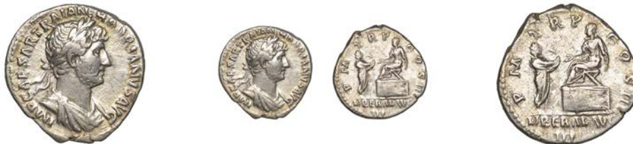
54 Denarius, c. 120-1, laureate draped and cuirassed bust right, rev. emperor seated left on platform, togate citizen before, LIBERAL AVG III in exergue, 3.22g (RIC 310; RSC 909a). About very fine, scarce £40-£50