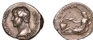
81 Denarius, 130-3, bare head left, rev. Africa reclining left, holding scorpion and cornucopiæ, 3.23g (RIC 1497; RSC 137a). Very fine, toned, scarce

Provenance: Glendining Auction, 14 December 1988, lot 393 (part)