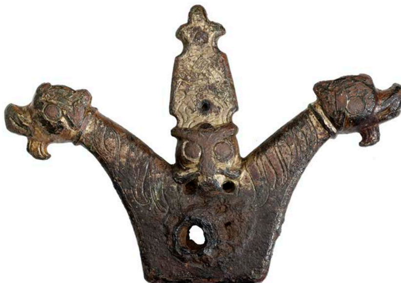
The unique Hinckley Viking horse fitting