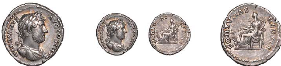
79 Denarius, c. 130, laureate draped bust right, rev. Fortuna seated left, holding cornucopiae and rudder set on globe, 3.58g (RIC 1411; RSC 782d). Good very fine £120-£150