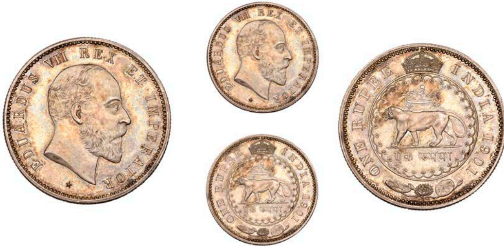
An original Pattern Rupee, 1901, Calcutta