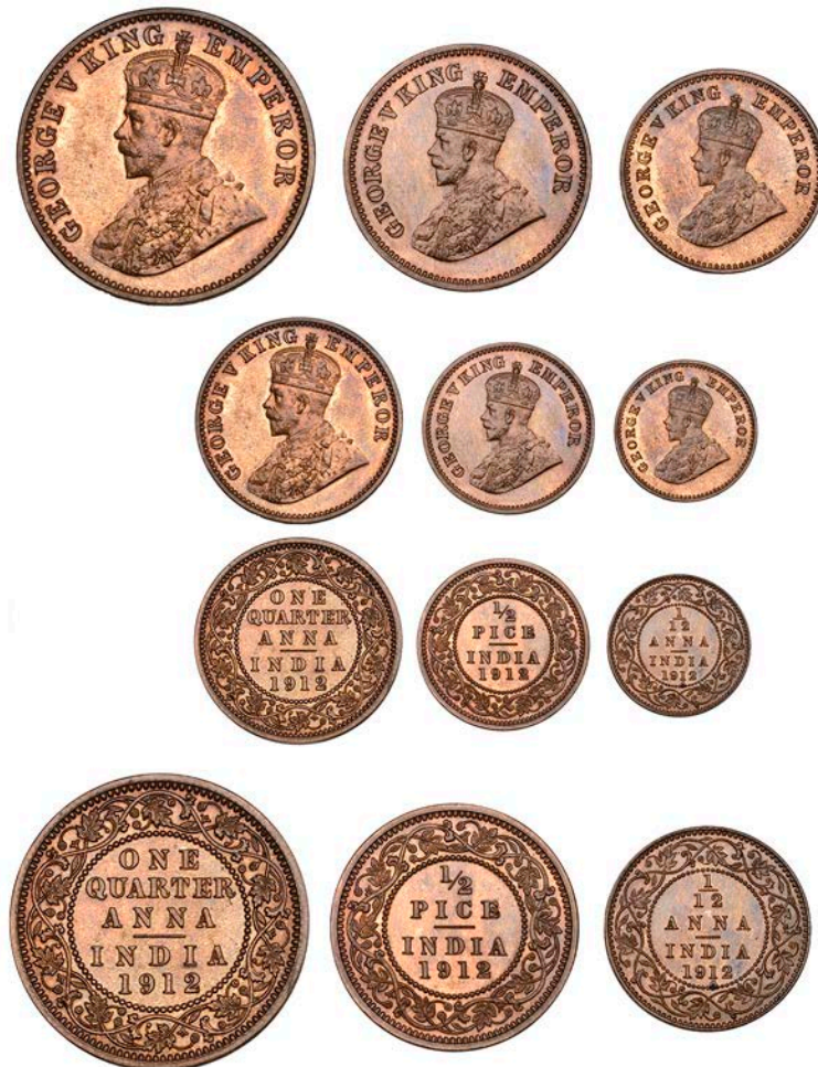
The Pridmore/Wheeler original bronze Proof set, 1912, Calcutta