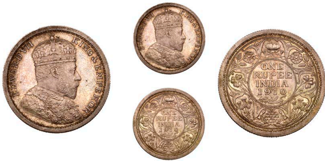
An original 1910 Pattern Rupee