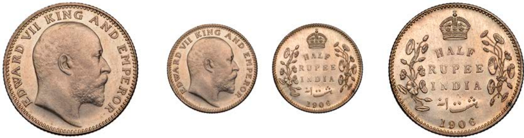
A stunning proof-like Half-Rupee, 1906, Bombay