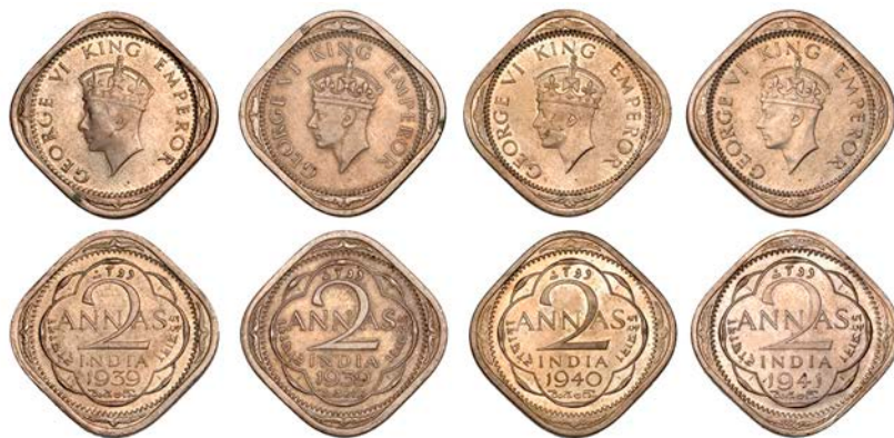
From the artist's personal collection