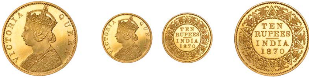
The Brand/Wheeler original Proof 10 Rupees, 1870, Royal Mint