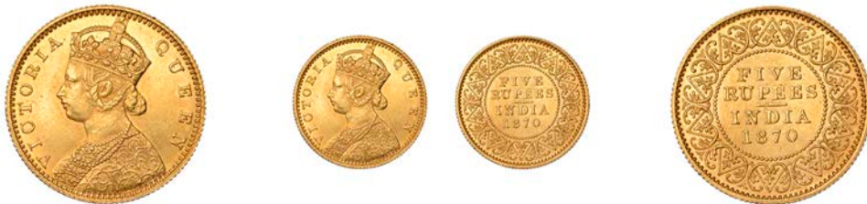
A superb currency issue 5 Rupees, 1870