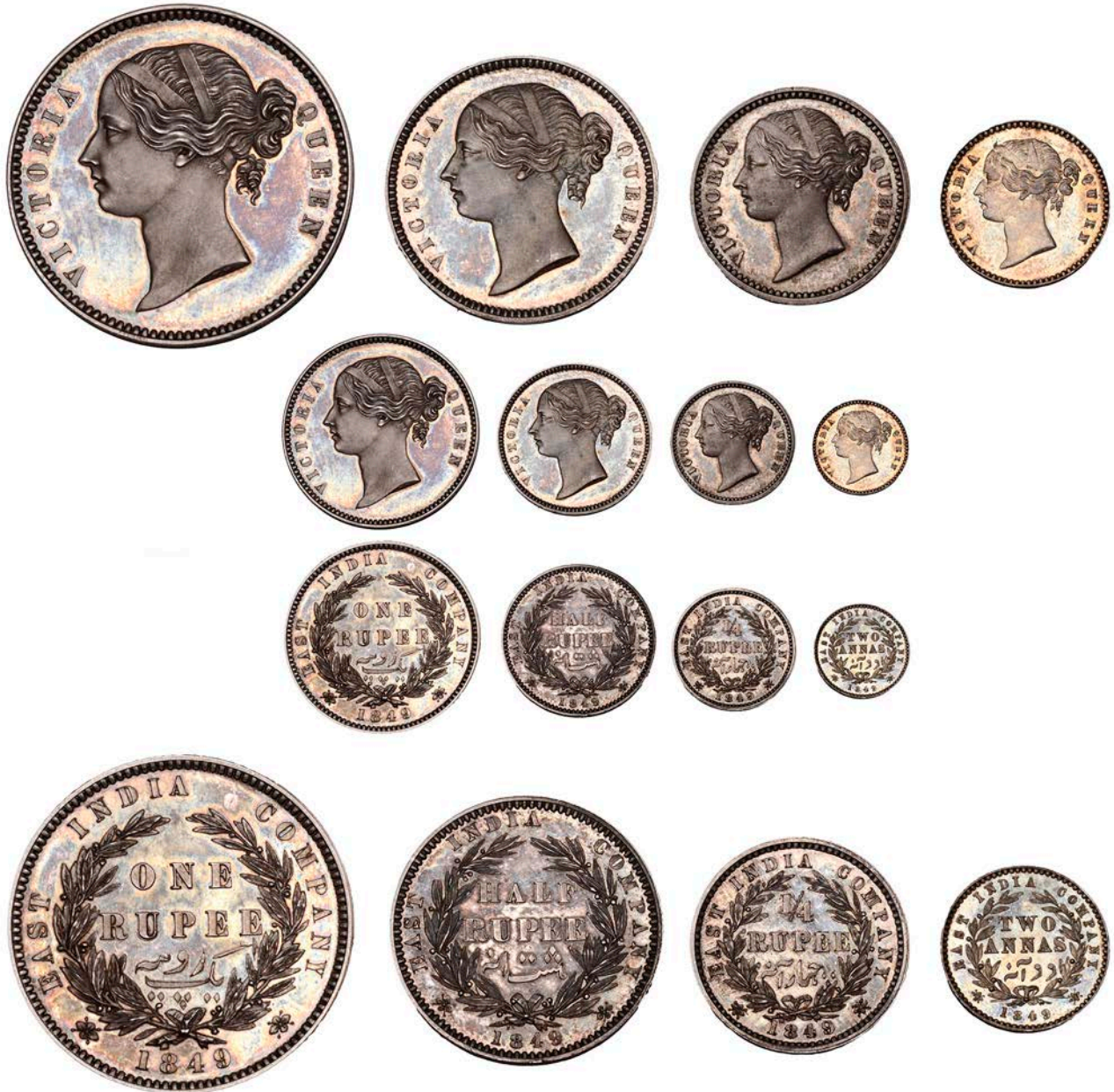
An exceptional original 1849 Pattern set

954 Victoria , original silver Pattern set, 1849 [Royal Mint, London], comprising Rupee, bust left, w.w. [William Wyon] on truncation, VICTORIA QUEEN divided, rev. ONE RUPEE, yek rupiya surrounded by laurel wreath with 25 berries, date below, edge plain, 11.24g/12h ( Prid. 65 [not in Sale]; SW 3.31; KM. PnA13; cf. Fore II, 798); Half-Rupee, bust left, w.w. [William Wyon] on truncation, VICTORIA QUEEN divided, rev. HALF RUPEE, hasht ana surrounded by laurel wreath with 24 berries, date below, edge plain, 4.99g/12h ( Prid. 84 [not in Sale]; SW 3.44; KM. PnG13; cf. Fore II, 801); Quarter-Rupee, bust left, w.w. [William Wyon] on truncation, VICTORIA QUEEN divided, rev. 1/4 RUPEE, chahar ana surrounded by laurel wreath with 10 berries, date below, edge plain, 2.61g/12h ( Prid. 113 [not in Sale]; SW 3.60; KM. PnC13; cf. Fore II, 801); 2 Annas, bust left, w.w. [William Wyon] on truncation, VICTORIA QUEEN divided, rev. TWO ANNAS, do ana surrounded by laurel wreath with 9 berries, date below, edge plain, 1.47g/12h ( Prid. 129 [not in Sale]; SW 3.71; KM. PnA16.1; cf. Fore II, 801) [4]. Brilliant FDC, matching tone, an exceptional set of the highest quality, extremely rare