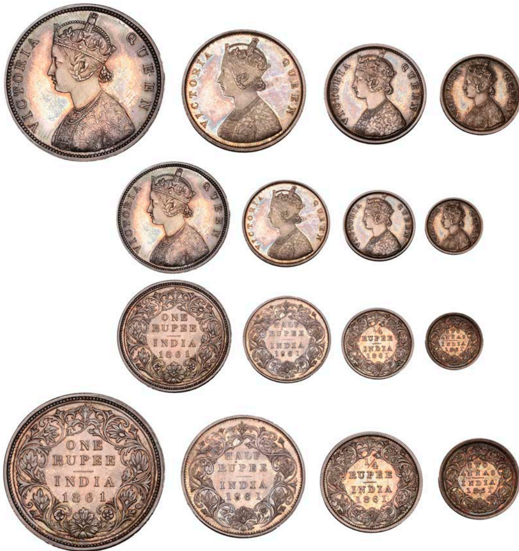
An extremely rare 1861 silver Pattern set, Royal Mint

1068 Victoria , original silver Pattern set, 1861, Royal Mint, London, by L.C. Wyon, comprising Rupee, type A/I, normal younger crowned and robed bust left, VICTORIA QUEEN, L.C. WYON below truncation, single line curves in Queen's crown, rev. ONE RUPEE above INDIA and date, all within scroll-like wreath of Indian flora, top flower emerging from three prongs, edge plain, 11.30g/6h ( Prid. 49 [Sale, lot 104]; SW 4.31; KM. Pn42; cf. Fore II, 804; cf. Sincona 75, 400); Half-Rupee, 1861, type A/I, similar, no signature, no pearls adjacent to centre jewel, rev. HALF RUPEE above INDIA and date, last numeral of date close to 6, edge plain, 5.68g/12h ( Prid. 250 [Sale, lot 138]; SW 4.114; KM. Pn40; cf. Fore II, 782; cf. Sincona 75, 401); Quarter-Rupee, 1861, similar, no signature, rev. 1/4 RUPEE above INDIA and date, edge plain, 2.79g/12h ( Prid. 371 [not in Sale]; SW 4.127; KM. Pn37; cf. Fore II, 779; cf. Sincona 75, 402); 2 Annas, 1861, similar, no signature, rev. TWO ANNAS above INDIA and date, edge plain, 1.36g/12h ( Prid. 481 [Sale, lot 155]; SW 4.139; KM. Pn35; cf. Fore II, 774; cf. Sincona 75, 403) [4]. Light hairlines in obverse fields, otherwise virtually as struck and attractively toned, extremely rare £15,000-£20,000