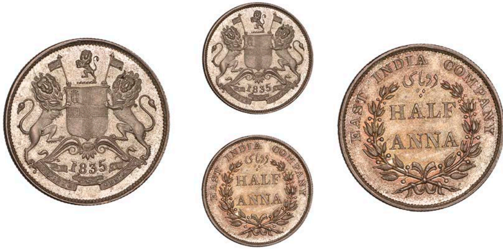
An 1835 Proof Half-Anna in silver

1008 Victoria , original Proof Half-Anna, 1835 [1845+], in silver, type A/I, Calcutta, arms and supporters, A USP : REG : & SEN : ANG : on riband, date above, rev. do pai HALF ANNA within laurel wreath of 20 berries, EAST INDIA COMPANY around, thin raised beaded border both sides, edge grained, 30mm, 11.69g/12h ( Prid. 136 [Sale, lot 43, this coin]; SW 1.77; KM. 447.2a; cf. Fore II, 747 [= Baldwin 101, 3457]; cf. Baldwin 83, 5193). Dull surfaces, otherwise virtually as struck, exceptionally rare; very few specimens known