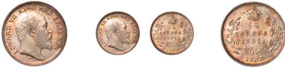
1369 Edward VII , silver Quarter-Rupee, 1903, Calcutta, uncrowned bust right, DES [George de Saulles] below, EDWARD VII KING AND EMPEROR, rev. 1/4 RUPEE INDIA, chahar ana [Four Annas], flanked by sprays of lotus flowers, crown above, date below, edge grained, 2.91g/12h ( Prid. 432 [Sale, lot 152]; SW 7.78; KM. 506; cf. Fore III, 2272). Brilliant mint state, proof-like fields, light peripheral toning £100-£150