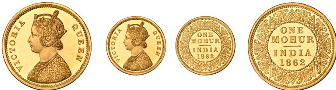
An exceptional original Proof Mohur, 1862