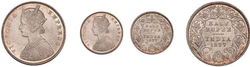
An exceptional 1877 Half-Rupee, Calcutta