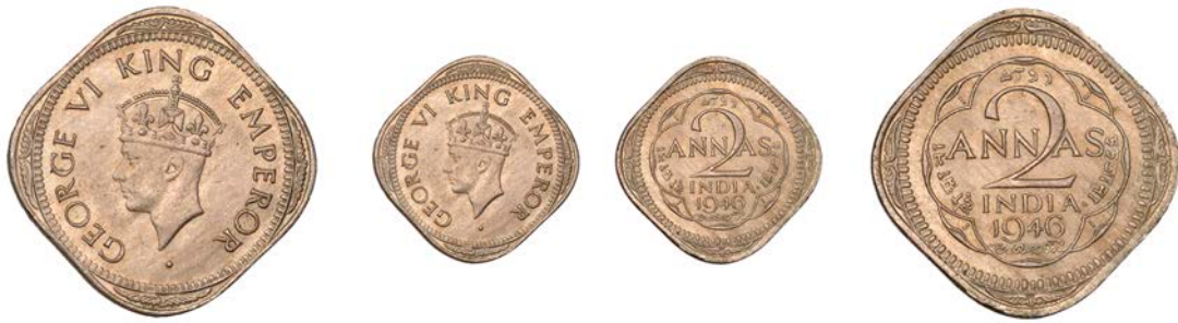
Pridmore's diamond-marked 2 Annas, 1946