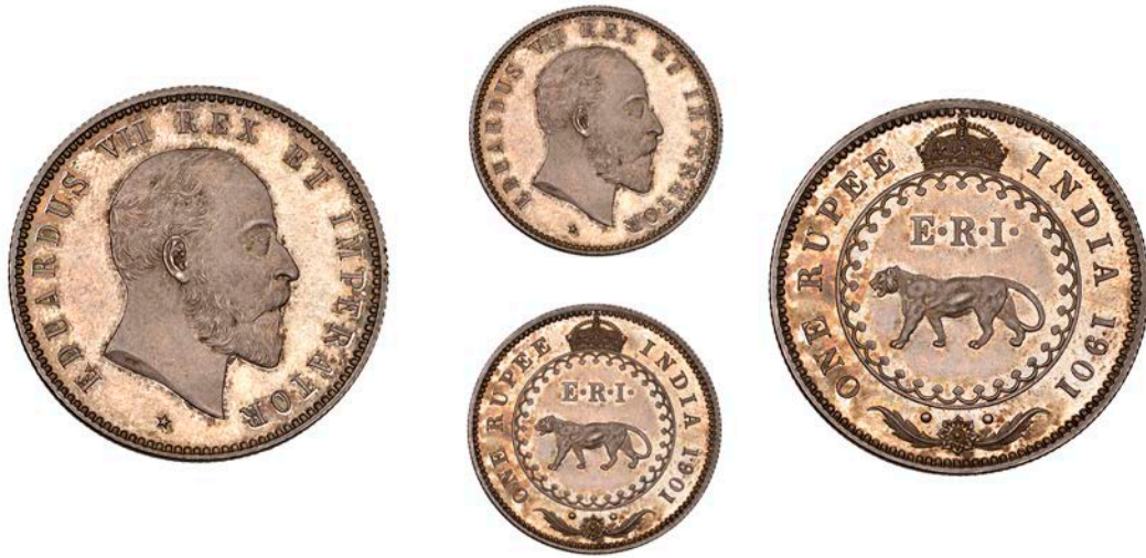
A second original Pattern Rupee, 1901, Calcutta

1641 Edward VII , original silver Pattern Rupee, 1901 [June-July 1901], Calcutta, by F.K. Wezel, type A/2, uncrowned bust right, κ.ω. [K. Wezel] on truncation, EDUARDUS VII REX ET IMPERATOR [Edward VII King and Emperor], rev. tiger walking left, no groundline, E·R·I· [Edward Rex Imperator] above, all within decorative arched circle, ONE RUPEE INDIA and date around, crown above, lotus flower below, edge grained, 11.69g/12h ( Prid. 1046 [Sale, lot 195]; SW 7.2; KM. Pn67; cf. Fore II, 818). Brilliant and toned, a superb coin and exceptionally rare as an original Pattern £12,000-£15,000