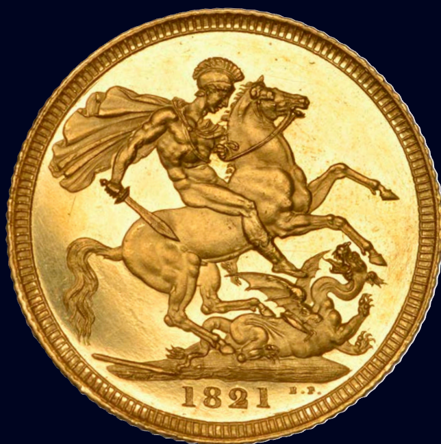
GEORGE IV, PROOF SOVEREIGN, 1821 ESTIMATE £7,000–£9,000

LOOKING TO SELL OR BUY COINS, MEDALS, BANKNOTES, JEWELLERY, WATCHES OR ANTIQUITIES? TRUST OUR EXPERTS