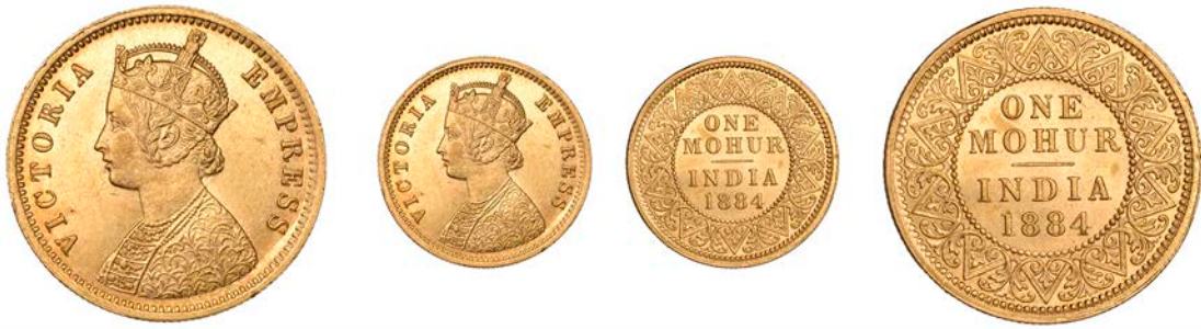
A superb example of the key date Mohur, 1884

1054 Victoria , gold Mohur, 1884, type A, Calcutta, younger crowned and robed bust left, VICTORIA EMPRESS, two flowers in lowest panel of jabot, v privy mark in centre of shoulder ornamentation, rev. ONE MOHUR above INDIA and date, all within star and entwined scrollwork, edge grained, 11.67g/12h ( Prid. 20 [Sale, lot 84]; SW 6.12; KM. 496; F 1604; cf. Fore III, 2471). Light rubbing on Queen's cheek and some associated bagmarks, otherwise extremely fine, reverse virtually as struck and with full mint bloom, very rare; the key date in the series £3,000-£3,600