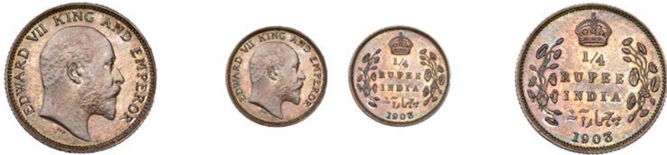
1371 Edward VII , early silver Proof restrike Quarter-Rupee, 1903, Calcutta, uncrowned bust right, DES [George de Saulles] below, EDWARD VII KING AND EMPEROR, rev. 1/4 RUPEE INDIA, chahar ana [Four Annas], flanked by sprays of lotus flowers, crown above, date below, edge grained, 2.91g/12h ( Prid. p.194 [not in Sale]; SW 7.79; KM. 506). Brilliant FDC, very rare £500-£700