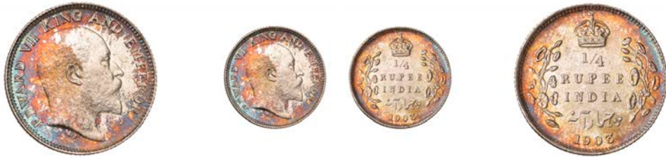
1370 Edward VII , silver Quarter-Rupee, 1903, Calcutta, uncrowned bust right, DES [George de Saulles] below, EDWARD VII KING AND EMPEROR, rev. 1/4 RUPEE INDIA, chahar ana [Four Annas], flanked by sprays of lotus flowers, crown above, date below, edge grained, 2.92g/12h ( Prid. 432 [Sale, lot 152]; SW 7.78; KM. 506; cf. Fore III, 2272). Brilliant mint state, partial rainbow tone £90-£120