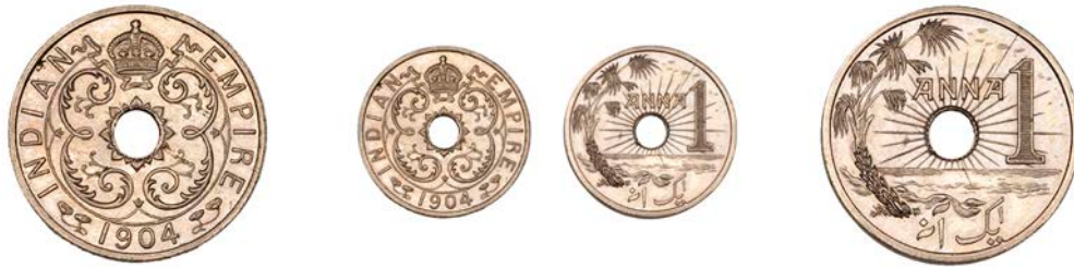
A series of Edward VII Pattern Proof Annas