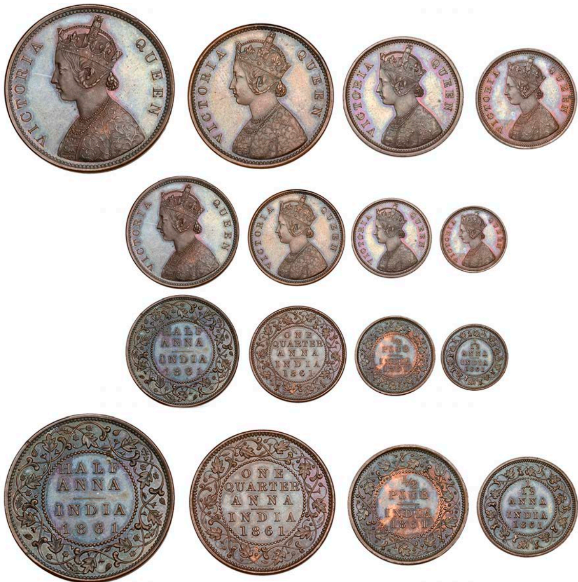
The Pridmore Proof Pattern set, 1861, in copper

1442 Victoria , copper Proof Pattern set, 1861, Royal Mint, London, by L.C. Wyon, comprising Half-Anna, crowned and robed bust left, VICTORIA QUEEN, 4.5 panels in jabot, rev. HALF ANNA above INDIA and date, all within scroll-like wreath of Indian flora, edge plain, 13.36g/12h ( Prid. 575 [Sale, lot 233, this coin ]; SW 4.150; KM. Pn33; cf. Fore III, 2188); Quarter-Anna, similar, but 4.75 panels in jabot, rev. ONE QUARTER ANNA above INDIA and date, last numeral of date a Roman 1, edge plain, 6.44g/12h ( Prid. 596 [Sale, lot 233, this coin ]; SW 4.160; KM. Pn30; cf. Fore II, 738); Half-Pice, similar, but 4.5 panels in jabot, rev. 1/2 PICE above INDIA and date, edge plain, 3.53g/12h ( Prid. 708 [Sale, lot 233, this coin ]; SW 4.174; KM. Pn32; cf. Fore II, 730); Twelfth-Anna, similar, but 4.75 panels in jabot, rev. 1/12 ANNA above INDIA and date, edge plain, 2.50g/12h ( Prid. 775 [Sale, lot 233, this coin ]; SW 4.182; KM. Pn28; cf. Fore II, 725) [4]. Brilliant mint state, matching tone, an extremely rare set £5,000-£6,000