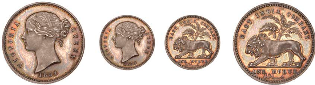
The Pridmore silver Proof Mohur, 1854