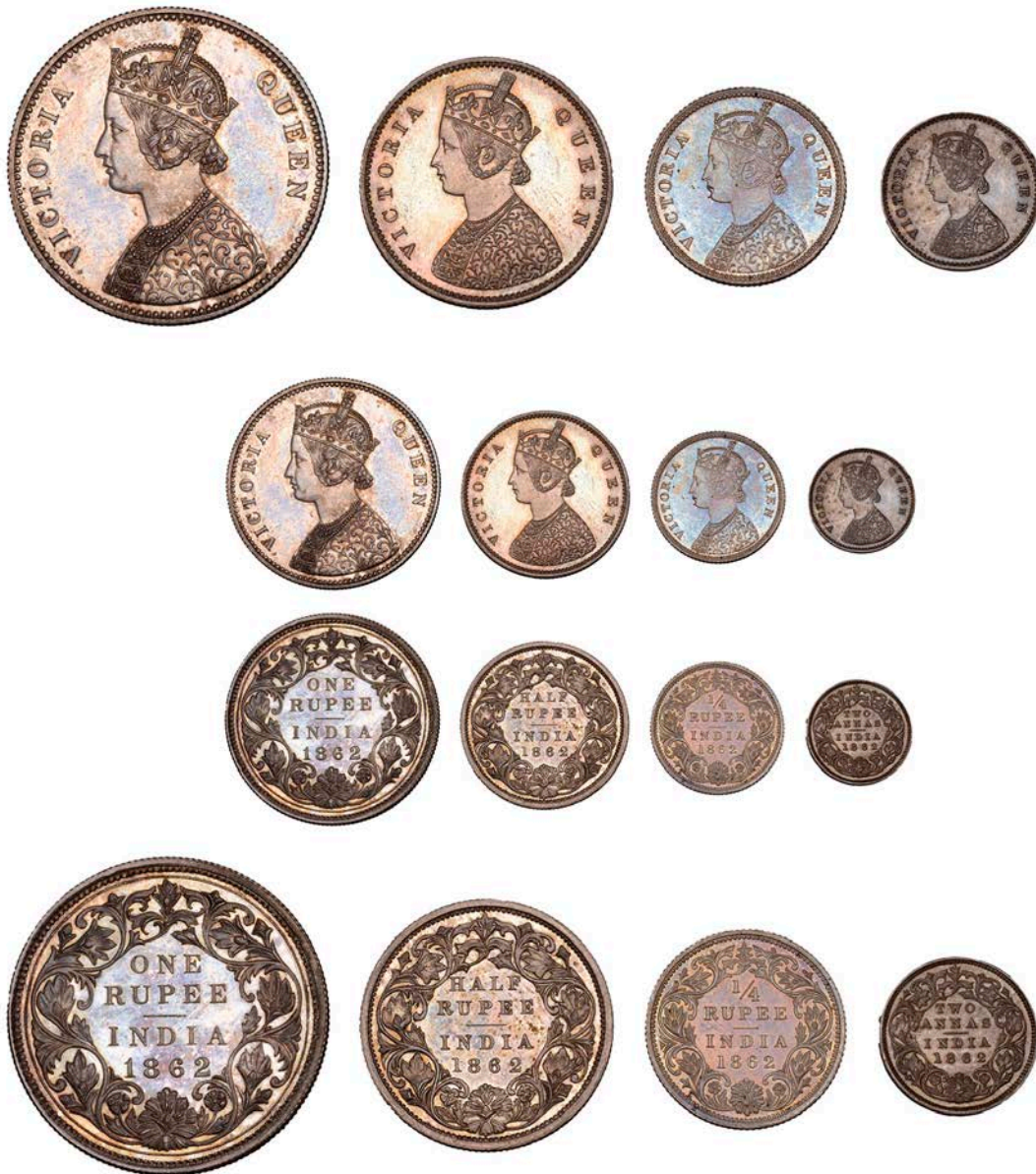
An original 1862 silver Proof set, Calcutta