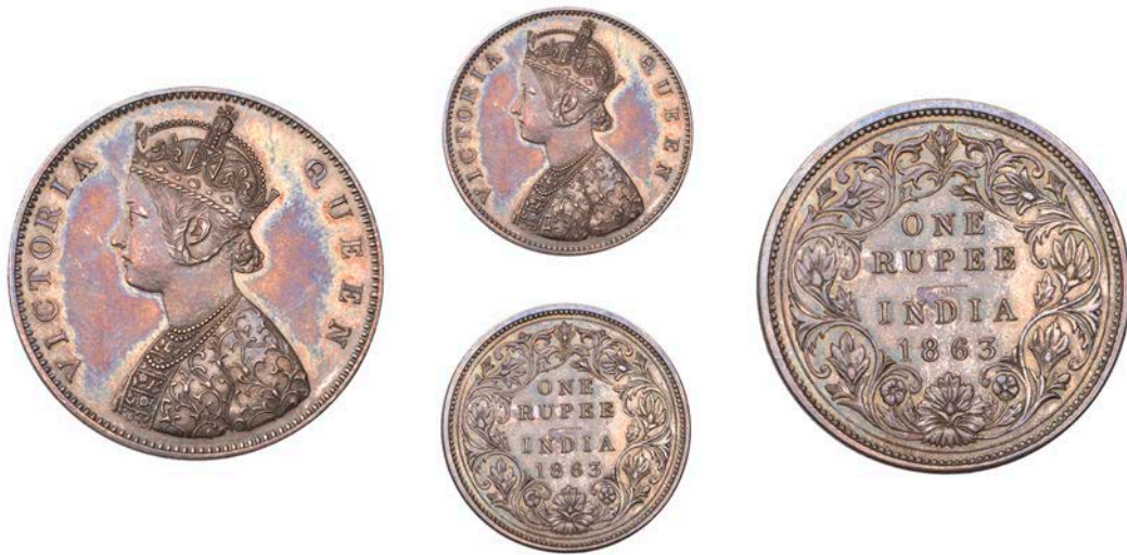
An exceptionally rare 1863 silver Proof Pattern Rupee, Royal Mint

1108 Victoria , original silver Proof Pattern Rupee, 1863, Royal Mint [by L.C. Wyon], crowned and robed bust left, VICTORIA QUEEN, 4.75 panels in jabot, no signature on truncation, embroidery in high relief, round pearls in crown with double line curves, rev. ONE RUPEE above INDIA and date, all within scroll-like wreath of Indian flora, top flower with points up, plain cone below, bud cone above ONE, no cone by last E of RUPEE, edge plain, 11.44g/12h ( Prid. 106 [Sale, lot 116]; SW 4.105; KM. Pn60). Trifling hairlines and a small toning spot above ND of INDIA, otherwise brilliant mint state, a stunning coin, exceptionally rare; the only coin of British India dated 1863