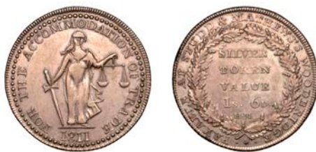
265 SUFFOLK, Woodbridge , Studd and Mathews, 'Morgan's' One Shilling and Sixpence, 1811, Justice standing, rev. value in wreath, edge grained, 6.10g/12h (D 9). Characteristic weakness in centre of reverse, otherwise very fine, rare £90-£120