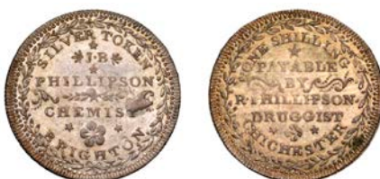
267 SUSSEX, Brighton [and Chichester] , Bradshaw and Robert Phillipson, Shilling, legend in wreath both sides, edge grained, 3.49g/12h (KR 303; D 1). Without the usual cross stamped at end of issuer's name on reverse, obverse bright from past cleaning, reverse with baseness of the silver evident, otherwise good very fine £80-£100