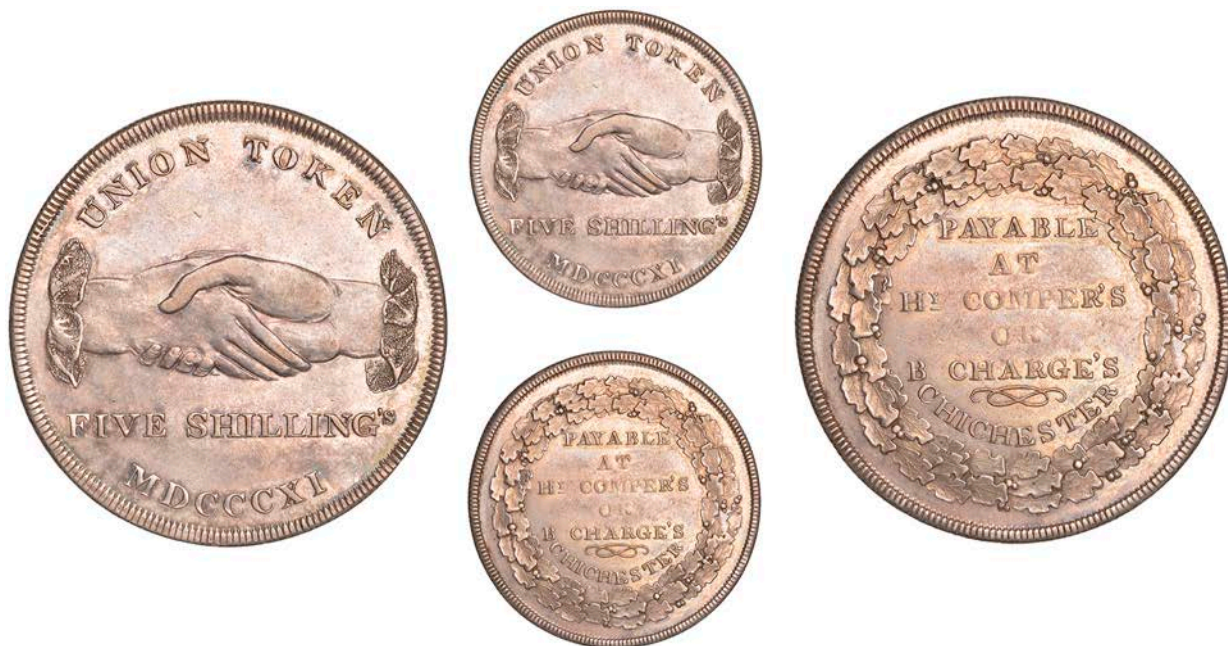
269 SUSSEX, Chichester , Henry Comper and Benjamin Charge, Five Shillings, 1811, clasped hands, rev. legend, edge grained, 18.81g/12h (KR 301d; D 2). Good very fine, pleasing light tone, very rare £900-£1,200

Provenance: A.C. Fraser Collection, Spink Auction 74, 29 November 1989, lot 396