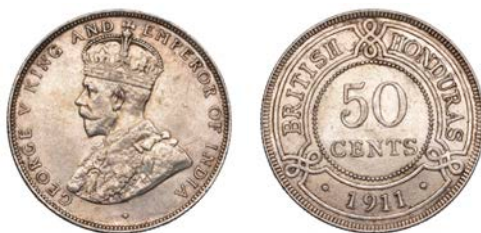
410 George V , 50 Cents, 1911 (KM. 18). Lightly hairlined from cleaning, good very fine and scarce thus