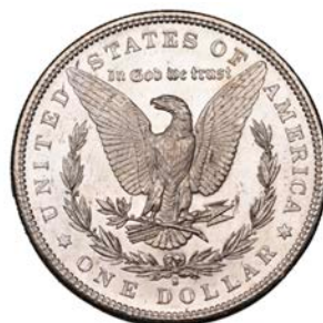
806 Dollar 1881s. Virtually mint state [slabbed NGC MS 64]