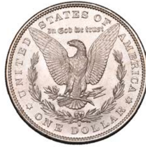
784 Dollar 1879s. Virtually mint state [slabbed NGC MS 65]