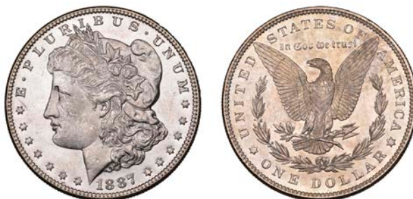
614 Dollar 1887. Virtually mint state [slabbed NGC MS 64]