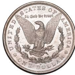
805 Dollar 1881s. Virtually mint state [slabbed NGC MS 63]