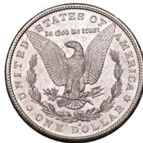
789 Dollar 1880s. Virtually mint state [slabbed NGC MS 63]