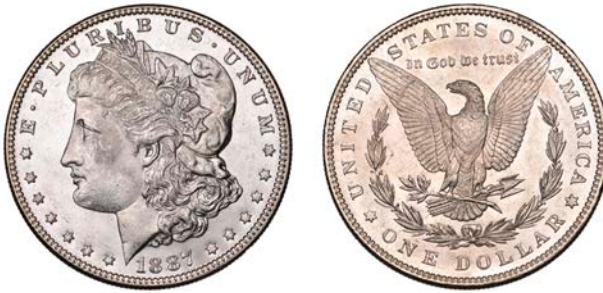
616 Dollar 1887. Virtually mint state [slabbed NGC MS 64]