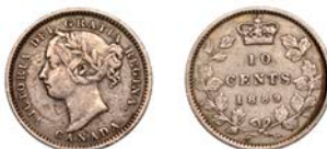
415 Victoria , 10 Cents, 1889 (KM 3). Fine, rare