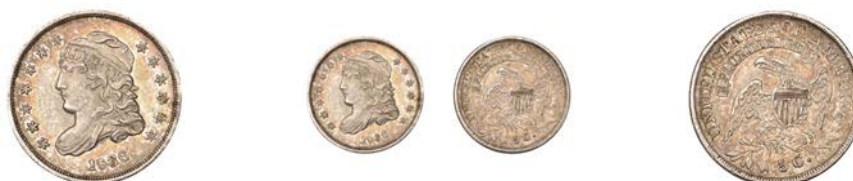
595 Half-Dime, 1836, small mark of value, centre of 8 thick, 3 re-punched, re-engraved N in UNITED (Breen 3211). About extremely fine, toned