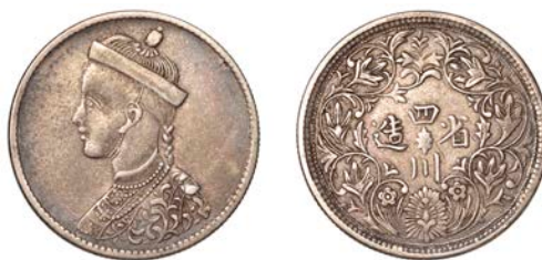
580 Szechuan-Tibet , trade coinage, Rupee, undated, small bust with collar, vertical rosette, 11.34g/6h (L & M 359; KM Y3.2). Near very fine £120-£150