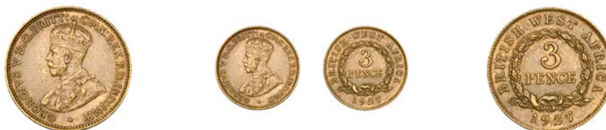
412 George V , Threepence, 1927 (Vice 130; KM 10b). About extremely fine, rare