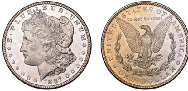
610 Dollar 1887. Virtually mint state [slabbed NGC MS 62]. About mint state