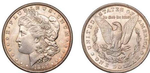
593 Dollar, 1887. Good extremely fine, lightly toned over residual bloom