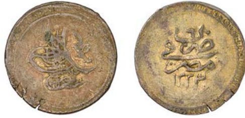
832 Mahmud II , Qirsh, Misr 1223h, yr 6, 6.04g/12h (OC 30-097-02; ICV 3560). Very fine for issue, rare