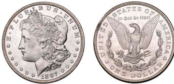
617 Dollar 1887. Virtually mint state [slabbed NGC MS 64]