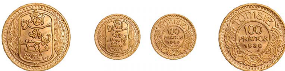
581 French Protectorate, Ahmad II , 100 Francs, 1930, Paris (KM. 257). Virtually mint state £240-£300