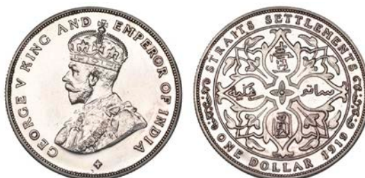
x 576 George V , restrike Proof Dollar, 1919 (cf. Prid. 9; KM 33). Brilliant, about as struck