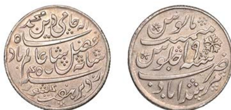
479 Murshidabad, Rupee, 1819 issue, Calcutta mint, without star below bad , edge grained straight, 12.38g/12h (Stevens 6.10; Prid. –). About extremely fine, rare £70-£100