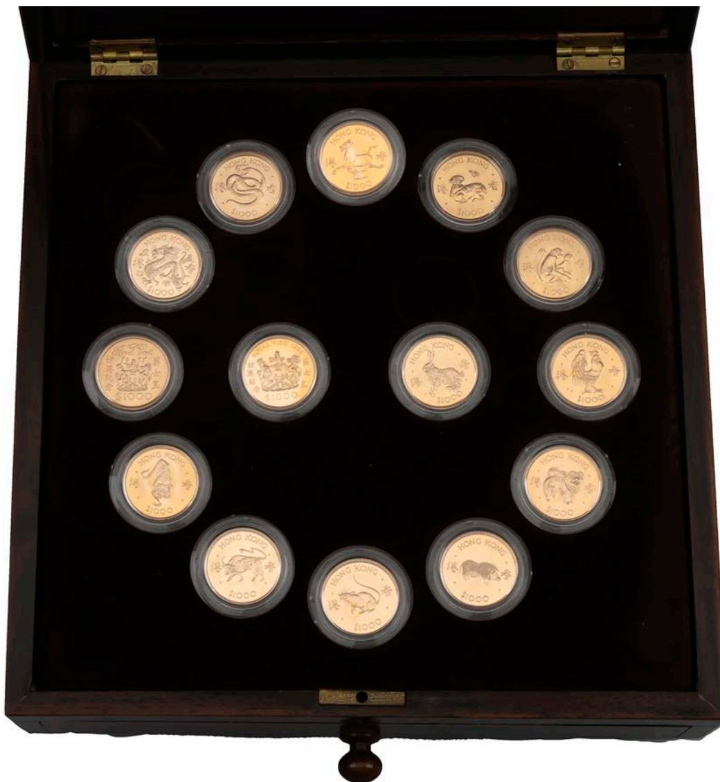
G 466 Elizabeth II , a Presentation set of One Thousand Dollars (14), 1975-1987, the 1986 a Proof [14]. All about as struck; housed in fitted wooden case £12,000-£15,000