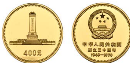
G 428 Republic, Proof 400 Yuan, 30th Anniversary of People's Republic (1979), rev. People's Heroes' Monument (KM. 5). About as struck