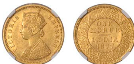
x 484 Victoria , Mohur, 1877c, Calcutta (KM. 496; Pr. 16). Bagmarks in fields, edge lightly filed [slabbed NGC UNC DETAILS Rim Filing] £1,000-£1,200