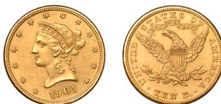
588 Ten Dollars, 1901 (KM. 102). Once cleaned, otherwise very fine