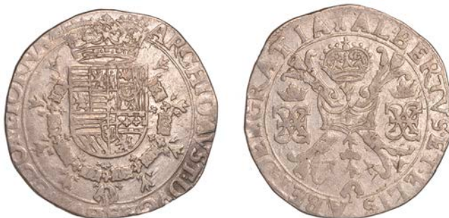
575 Albert and Isabella , Patagon, c. 1612-21, Tournai, 28.12g (KM. 31). Weakly struck but otherwise very fine