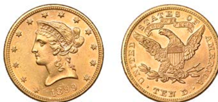
587 Ten Dollars, 1899 (KM. 102). Light bagmarks on obverse, otherwise virtually mint state