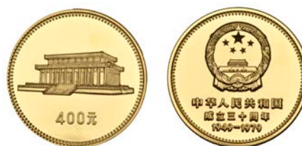
G 429 Republic, Proof 400 Yuan, 30th Anniversary of People's Republic (1979), rev. Chairman Mao Memorial Hall (KM. 6). About as struck