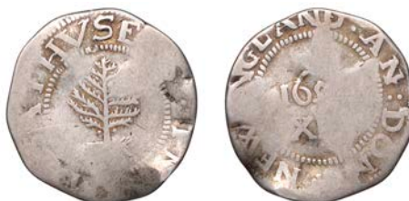
584 MASSACHUSETTS , Pine Tree Shilling, 165[2], 4.21g/12h (Noe 1). Creased and straightened, flat in places, fine or better £400-£500