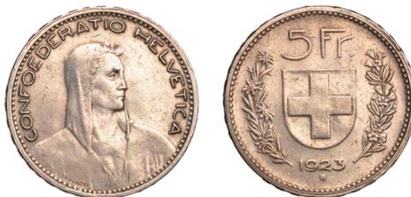
579 Confederation , 5 Francs, 1923 B (KM. 37). Once lightly cleaned, otherwise very fine