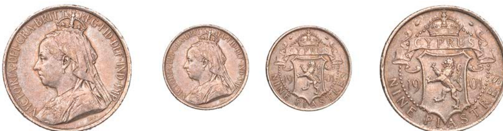
430 Victoria, 9 Piastres, 1901 (KM. 6). Very fine