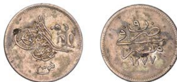
836 Abdul Aziz , Two-and-a-Half Qirsh, Misr 1277h, yr 9, 3.42g/12h (OC 32-019; KM 252). Small flan flaw on obverse, otherwise very fine, rare