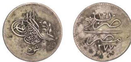
835 Abdul Aziz , 5 Qirsh, Misr 1277h, yr 12, 6.49g/12h (OC 32-018; KM 254a). Some surface deposit, otherwise very fine, very rare