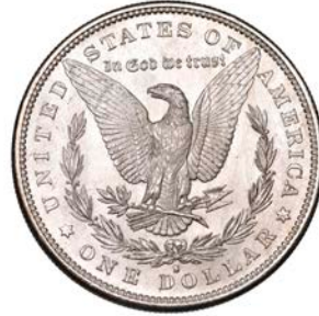
785 Dollar 1879s. Virtually mint state [slabbed NGC MS 64]