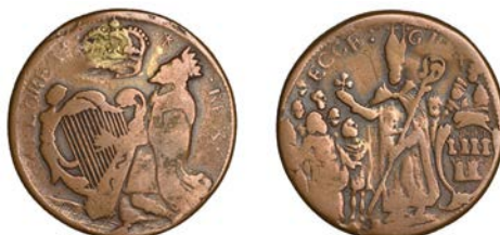
x 585 St Patrick's coinage , 'Halfpenny', small letters, 9.29g/12h (Vlack/Martin 4-E; Whitman 11540; Breen 204; S 6567). Brass plug, fine, rare £800-£1,000