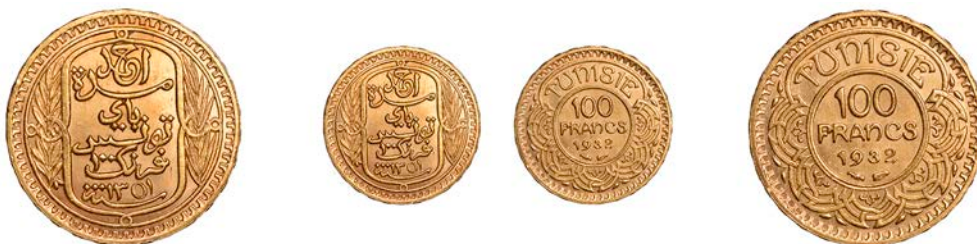
582 French Protectorate, Ahmad II , 100 Francs, 1930, Paris (KM. 257). Virtually mint state £240-£300