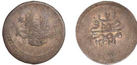
833 Mahmud II , Qirsh, Misr 1223h, yr 7, 5.89g/12h (OC 30-097-02; ICV 3560). About very fine, rare