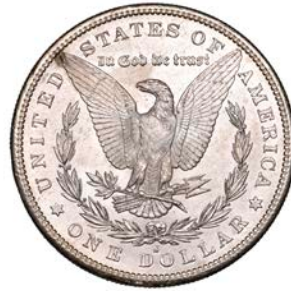
802 Dollar 1881s. Virtually mint state [Slabbed NGC MS 63]