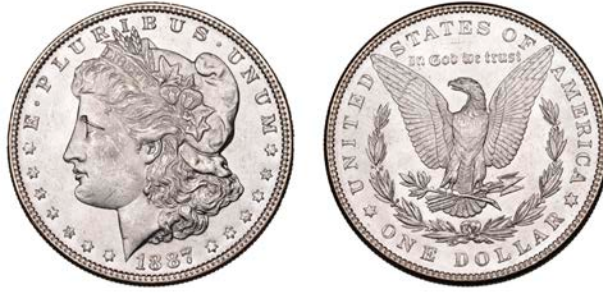
615 Dollar 1887. Virtually mint state [slabbed NGC MS 63]