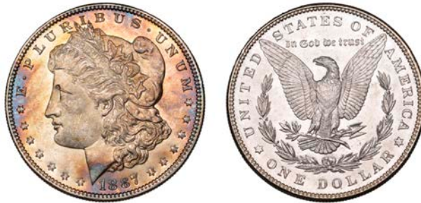
611 Dollar 1887. Virtually mint state [slabbed NGC MS 64]