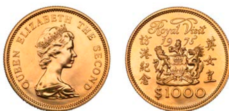
G 467 Elizabeth II , One Thousand Dollars, 1975, Royal Visit (KM. 38). About as struck £800-£1,000