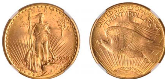
G 586 Twenty Dollars, 1920. Extremely fine [graded NGC MS 62]