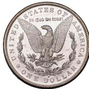
804 Dollar 1881s. Virtually mint state [slabbed NGC MS 63]