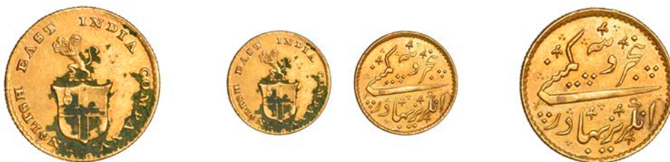
G 480 Five Rupees or Third-Mohur, undated [1820], coat-of-arms surmounted by lion rampant holding crown, rev. denomination and inscription in Persian, 3.89g/12h (Prid. 244; KM. 422; F 1590). Very fine but green wax (?) deposit on obverse £300-£400