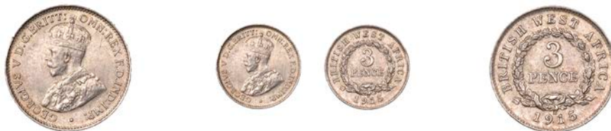
411 George V , Threepence, 1915 H (Vice 120; KM 10). A few light marks, otherwise extremely fine, scarce