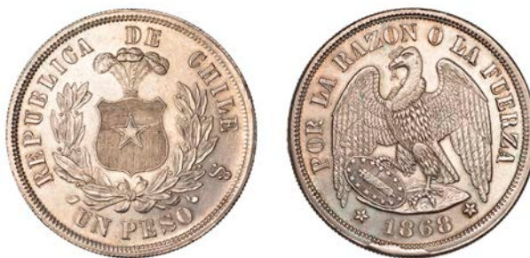
424 Republic, Peso, 1868, Santiago (KM. 142.1). Perhaps lightly cleaned, otherwise almost extremely fine