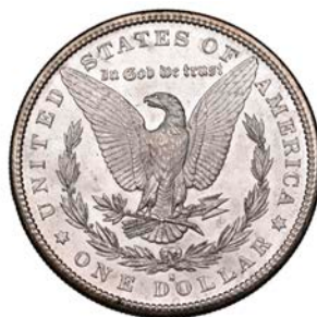
790 Dollar 1880s. Virtually mint state [slabbed NGS MS 64]