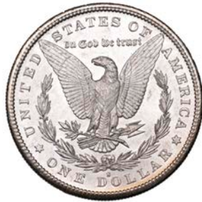
788 Dollar 1880s. Virtually mint state [slabbed NGC MS 65]