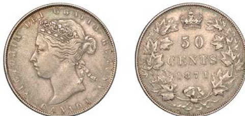
414 Victoria , 50 Cents, 1871, Ottawa (KM. 6). Residue and once cleaned, otherwise about fine