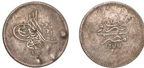
834 Abdul Aziz , 10 Qirsh, Misr 1277h, yr 2, 12.58g/12h (OC 32-017-02; KM 256). Some fire damage, otherwise very fine, very rare