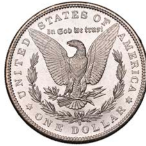
803 Dollar 1881s. Virtually mint state [slabbed NGC MS 63]