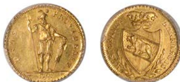
577 Berne , Half Duplone, 1797 (KM. 162; HMZ. 2-216; Fr. 188). A pleasing example with full lustre, virtually mint state [slabbed PCGS MS 63]