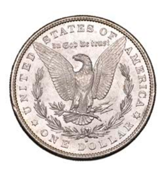
799 Dollar 1881s. Virtually mint state [slabbed NGC MS 63]