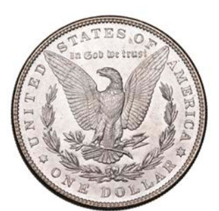
607 Dollar 1887. Virtually mint state [slabbed NGC MS 65]