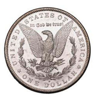
804 Dollar 1881s. Virtually mint state [slabbed NGC MS 63]