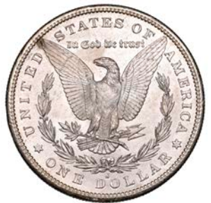
802 Dollar 1881s. Virtually mint state [Slabbed NGC MS 63]