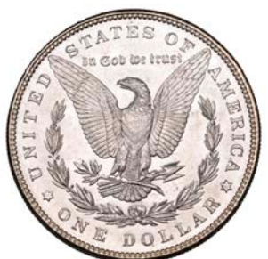
611 Dollar 1887. Virtually mint state [slabbed NGC MS 64]