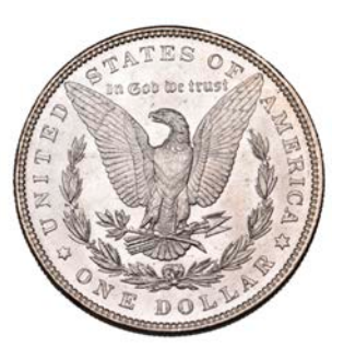
606 Dollar 1887. Virtually mint state [slabbed NGC MS 64]