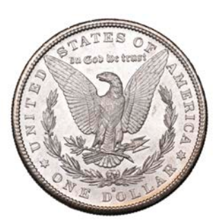
788 Dollar 1880s. Virtually mint state [slabbed NGC MS 65]