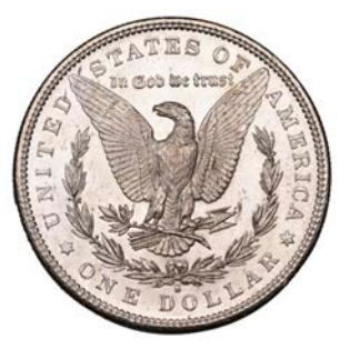
806 Dollar 1881s. Virtually mint state [slabbed NGC MS 64]