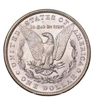
608 Dollar 1887. Virtually mint state [slabbed NGC MS 64]