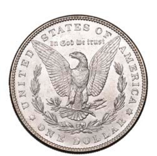
613 Dollar 1887. Virtually mint state [slabbed NGC MS 65]