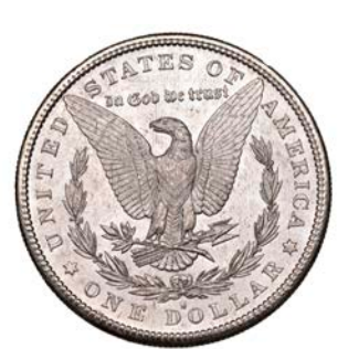
789 Dollar 1880 s. Virtually mint state [slabbed NGC MS 63]