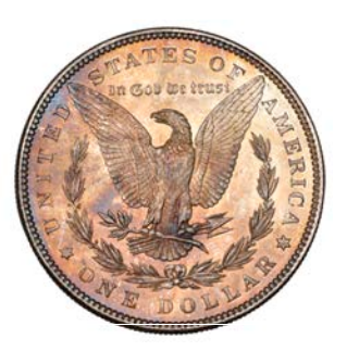
609 Dollar 1887. Virtually mint state [slabbed NGC MS 66]