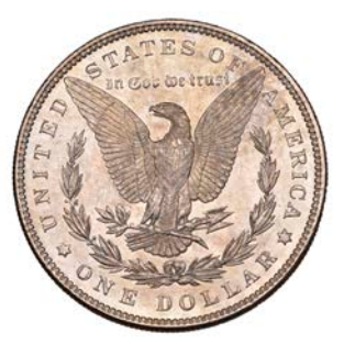
614 Dollar 1887. Virtually mint state [slabbed NGC MS 64]