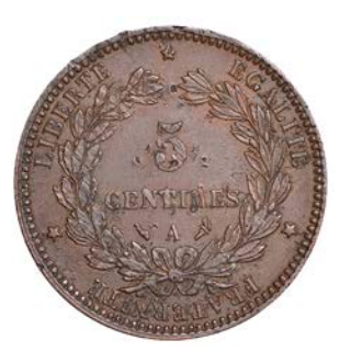
445 5 Centimes, 1896A, Paris, torch privy mark (Gad. 157a; KM 821.1). Some surface marks, otherwise about extremely fine, rare £70-£100