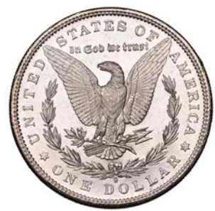
803 Dollar 1881s. Virtually mint state [slabbed NGC MS 63]