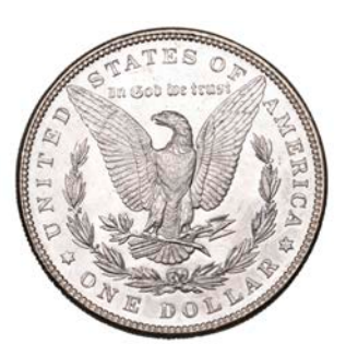
612 Dollar 1887. Virtually mint state [slabbed NGC MS 64]