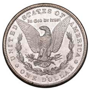
790 Dollar 1880s. Virtually mint state [slabbed NGS MS 64]