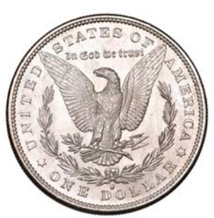
785 Dollar 1879s. Virtually mint state [slabbed NGC MS 64]