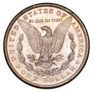
801 Dollar 1881s. Virtually mint state [slabbed NGC MS 63]