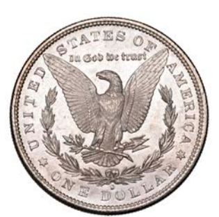
805 Dollar 1881s. Virtually mint state [slabbed NGC MS 63]