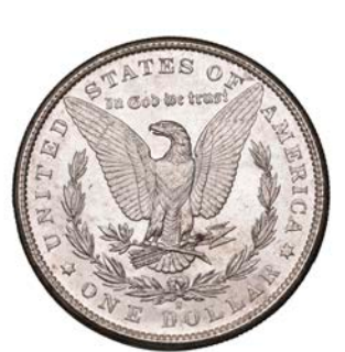
800 Dollar 1881s. Virtually mint state [slabbed NGC MS 63]