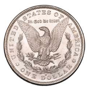
784 Dollar 1879s. Virtually mint state [slabbed NGC MS 65]