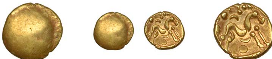
7 GALLO-BELGIC , Stater, series E [Ambiani], Gallic War uniface type, shallow dome, rev. stylised horse standing right, charioteer's arm above, 'thunderbolt' behind, corded exergue line, 6.01g (LH 7, this coin ; ABC 16; VA 54-1; S 11). Very fine, some toning £400-£600