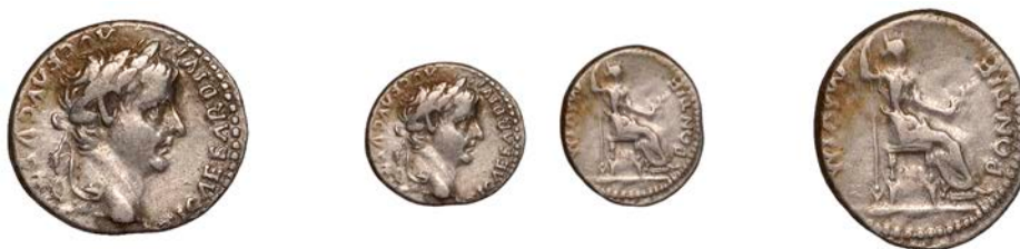
242 Denarius, Lugdunum, after AD 16, TI CAESAR DIVI AVG F AVGVSTVS around laureate head right, rev. PONTIF MAXIM around Livia as Pax, draped and seated right on chair with ornamented legs, feet on footstool, holding branch in left hand and sceptre in right, single line below, 3.62g/3h (Ghey 394.27, this coin ; BMC 48-60; RIC 30; RSC 16a). Fine £80-£100