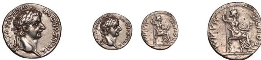
264 Denarius, Lugdunum, after AD 16, TI CAESAR DIVI AVG F AVGVSTVS around laureate head right, rev. PONTIF MAXIM around Livia as Pax, draped and seated right on chair with ornamented legs, feet on footstool, holding branch in left hand and sceptre in right, single line below, 3.73g/9h (Ghey 394.47, this coin ; BMC 48-60; RIC 30; RSC 16a). Good fine, portrait better and of unusual style £100-£150