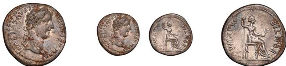
246 Denarius, Lugdunum, after AD 16, TI CAESAR DIVI [-]VG F AVGVSTVS around laureate head right, rev. PONTIF MAXIM around Livia as Pax, draped and seated right on chair with ornamented legs, feet on footstool, holding branch in left hand and sceptre in right, single line below, 3.77g/10h (Ghey 394.10, this coin ; BMC 48-60; RIC 30; RSC 16a). Patchy patina, well centred and good fine £80-£100