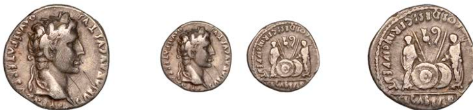
217 Denarius, Lugdunum, 2 BC-AD 4, CAESAR AVGVSTVS DIVI F PATER PATRIAE around laureate head of Augustus right, rev. C L CAESAR[-] in exergue, [-] COS DESIG PRINC IVVENT around Gaius and Lucius Caesar standing front, each togate and resting hand on shields, behind each is a spear upright, in field between simpulum left and lituus right, 3.66g/6h (Ghey 372.23, this coin ; BMC 519-35; RIC 207; RSC 43). Graffito 'X' to obverse beneath Augustus' chin, fine £60-£80