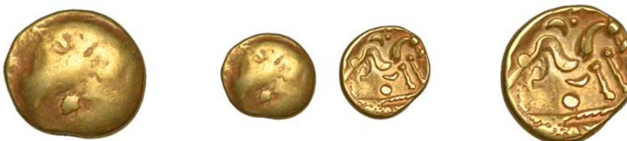
24 GALLO-BELGIC , Stater, series E [Ambiani], Gallic War uniface type, shallow dome with prominent die break, rev. stylised horse standing right, trace of charioteer's arm above, complex exergue comprising corded line over row of linked annulets, 5.96g (LH 24, this coin ; ABC 16; VA 54-1; S 11). Very fine, rather well centred £500-£600