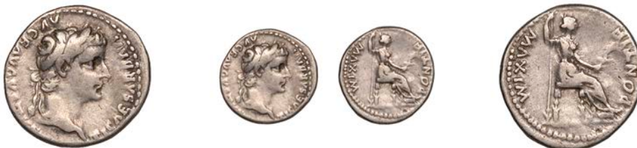
239 Denarius, Lugdunum, after AD 16, TI CAESAR DIVI AVG F AVGVS[-] around laureate head right, rev. PONTIF MAXIM around Livia as Pax, draped and seated right on chair with ornamented legs, feet on footstool, holding branch in left hand and sceptre in right, single line below, 3.78g/3h (Ghey 394.21, this coin ; BMC 48-60; RIC 30; RSC 16a). Good fine with some areas of striking weakness £100-£150