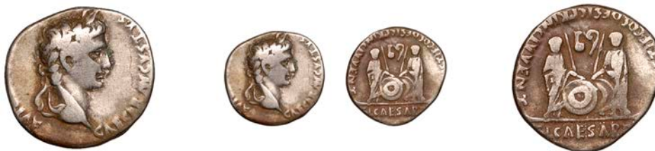
218 Denarius, Lugdunum, 2 BC-AD 4, CAESAR AVGVSTVS [-]IAE around laureate head of Augustus right, rev. C L CAESAR[-] in exergue, [-]STI F COS DESIG PRINC IVVENT around Gaius and Lucius Caesar standing front, each togate and resting hand on shields, behind each is a spear upright, in field between simpulum left and lituus right, 3.72g/8h (Ghey 372.28, this coin ; BMC 519-35; RIC 207; RSC 43). Fine £60-£80