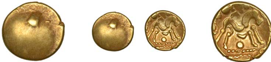
16 GALLO-BELGIC , Stater, series E [Ambiani], Gallic War uniface type, shallow dome with prominent die break and trace of rough foids around, rev. stylised horse standing right, charioteer's arm above, 'coffee bean' and 'thunderbolt' behind, complex exergue comprising corded line over row of linked annulets, 5.95g (LH 16, this coin ; ABC 16; VA 54-1; S 11). A little striking weakness, about very fine, well centred £400-£600