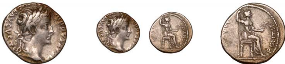
243 Denarius, Lugdunum, after AD 16, TI CAESAR DIV[-]VG F AVGVSTVS around laureate head right, rev. PONTIF M[-] around Livia as Pax, draped and seated right on chair with ornamented legs, feet on footstool, holding branch in left hand and sceptre in right, single line below, 3.71g/6h (Ghey 394.25, this coin ; BMC 48-60; RIC 30; RSC 16a). Struck on a slightly irregular flan, otherwise about very fine £80-£100