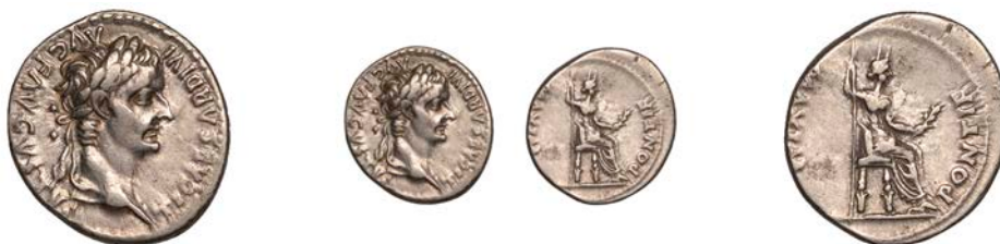
240 Denarius, Lugdunum, after AD 16, TI CAESAR DIVI AVG F AVGVS[-] around laureate head right, rev. PONTIF MAXIM around Livia as Pax, draped and seated right on chair with ornamented legs, feet on footstool, holding branch in left hand and sceptre in right, single line below, 3.75g/6h (Ghey 394.22, this coin ; BMC 48-60; RIC 30; RSC 16a). Good fine, portrait better and well struck up £100-£150