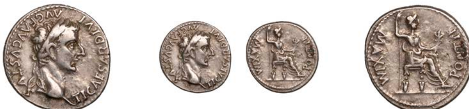
263 Fourrée Denarius, after Lugdunum, after AD 16, TI CAESAR DIVI AVG F AVGVSTVS around laureate head right, rev. PONTIF MAXIM around Livia as Pax, draped and seated right on chair with ornamented legs, feet on footstool, holding branch in left hand and sceptre in right, single line below, 3.16g/9h (Ghey 394.37, this coin ; BMC 48-60; RIC 30; RSC 16a). Break in plating in reverse legend revealing a copper core, otherwise very fine £60-£80