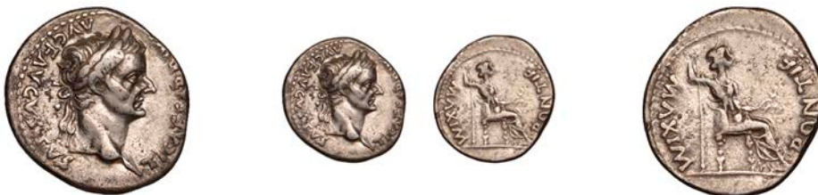
245 Denarius, Lugdunum, after AD 16, TI CAESAR DI[-] AVG F AVGVSTVS around laureate head right, rev. PONTIF MAXIM around Livia as Pax, draped and seated right on chair with ornamented legs, feet on footstool, holding branch in left hand and sceptre in right, single line below, 3.79g/6h (Ghey 394.1, this coin ; BMC 48-60; RIC 30; RSC 16a). Struck on a slightly irregular flan, otherwise good fine, the portrait better and well struck up £90-£120