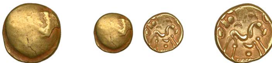
8 GALLO-BELGIC , Stater, series E [Ambiani], Gallic War uniface type, shallow dome with pronounced die break, rev. stylised horse standing right, charioteer's arm above, 'coffee bean' and 'thunderbolt' behind, 'coffee bean' before head, corded exergue line, 5.99g (LH 7, this coin ; ABC 16; VA 54-1; S 11). Good very fine, well centred and with light hoard patina £600-£800