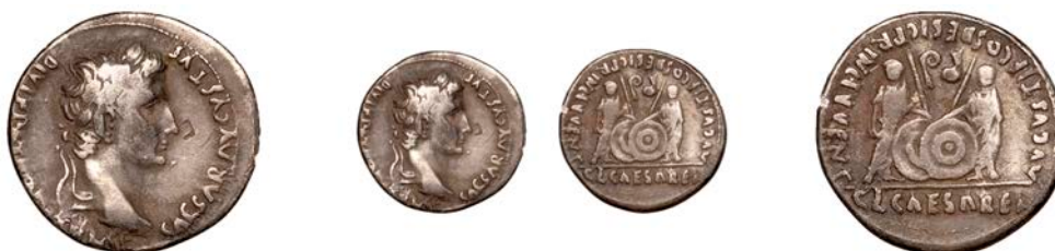
220 Denarius, Lugdunum, 2 BC-AD 4, CAESAR AVGVSTVS DIVI F PAT[-]RIAE around laureate head of Augustus right, rev. C L CAESARES in exergue, AVGVSTI F COS DESIG PRINC IVVENT around Gaius and Lucius Caesar standing front, each togate and resting hand on shields, behind each is a spear upright, in field between lituus left and simpulum right, 3.64g/11h (Ghey 373.2, this coin ; BMC 540-43; RIC 210; RSC 43c). Discrete banker's mark to obverse right of Augustus, otherwise fine £60-£80

This coin is likely the work of a contemporary forger, the reverse legend is misspelt as COT F F SIG and is inconsistently sized. However the remainder of the design appears very good. It is likely a silver plated copy with a copper core. Within a small crack running from 3 o'clock to 7 o'clock, there are gaps where a red tint can be seen coming through. There also appears to be a small area right of the lituus where some copper may have come through and oxidised. No other examples of this misspelling are currently known, making this a rather unusual specimen.