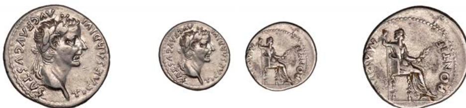
262 Denarius, Lugdunum, after AD 16, TI CAESAR DIVI AVG F AVGVSTVS around laureate head right, rev. PONTIF MAXIM around Livia as Pax, draped and seated right on chair with ornamented legs, feet on footstool, holding branch in left hand and sceptre in right, single line below, 3.72g/12h (Ghey 394.29, this coin ; BMC 48-60; RIC 30; RSC 16a). Reverse struck off centre, otherwise very fine £100-£150