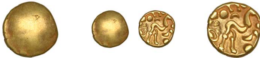
17 GALLO-BELGIC , Stater, series E [Ambiani], Gallic War uniface type, shallow dome, rev. stylised horse standing right, charioteer's arm above, 'coffee bean' and 'thunderbolt' behind, 5.93g (LH 17, this coin ; ABC 16; VA 54-1; S 11). Struck slightly off-centre, very fine £300-£400