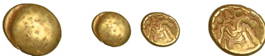
20 GALLO-BELGIC , Stater, series E [Ambiani], Gallic War uniface type, shallow dome, rev. stylised horse standing right, charioteer's arm above, 'thunderbolt' behind, 'coffee bean' and curve of pellets before horse's face, 5.89g (LH 20, this coin ; ABC 16; VA 54-1; S 11). A little scuffed on obverse, otherwise good fine, yellowish gold £300-£400