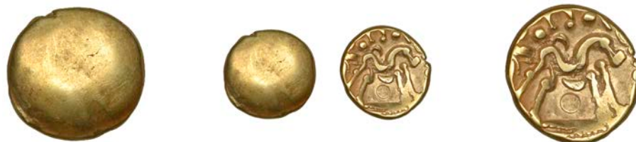
26 GALLO-BELGIC , Stater, series E [Ambiani], Gallic War uniface type, shallow dome, rev. stylised horse standing right, charioteer's arm above, 'thunderbolt' behind, 'coffee bean' and curve of pellets before horse's face, complex exergue comprising corded and pelleted lines, 5.88g (LH 26, this coin ; ABC 16; VA 54-1; S 11). Some die flaws on reverse, otherwise very fine £500-£700