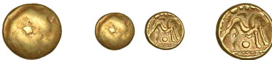
23 GALLO-BELGIC , Stater, series E [Ambiani], Gallic War uniface type, shallow dome, with prominent die break, rev. stylised horse standing right with splayed hind legs, charioteer's arm above, 'coffee bean' and 'thunderbolt' behind, corded exergue line, 5.94g (LH 23, this coin ; ABC 16; VA 54-1; S 11). Nearly very fine, well centred, yellowish gold £500-£700