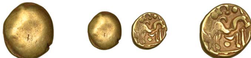
22 GALLO-BELGIC , Stater, series E [Ambiani], Gallic War uniface type, shallow dome, rev. stylised horse standing right with straight legs, charioteer's arm above, corded exergue line, floral motif below horse's hind legs, 5.80g (LH 22, this coin ; ABC 16; VA 54-1; S 11). Struck from a worn reverse die, otherwise about very fine, yellowish gold £300-£400