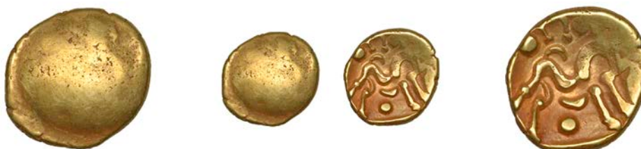
10 GALLO-BELGIC , Stater, series E [Ambiani], Gallic War uniface type, shallow dome rev. stylised horse standing right, charioteer's arm above, 5.98g (LH 10, this coin ; ABC 16; VA 54-1; S 11). Some weakness of strike, nearly very fine £400-£600