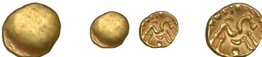
27 GALLO-BELGIC , Stater, series E [Ambiani], Gallic War uniface type, shallow dome, rev. stylised horse standing right, charioteer's arm above, trace of 'coffee bean' and curve of pellets before horse's face, 6.00g (LH 27, this coin ; ABC 16; VA 54-1; S 11). Very fine, light hoard patina £500-£700