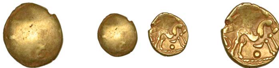
6 GALLO-BELGIC , Stater, series E [Ambiani], Gallic War uniface type, shallow dome, rev. stylised horse standing right, charioteer's arm above, 'coffee bean' and 'thunderbolt' behind, corded exergue line, 6.00g (LH 6, this coin ; ABC 16; VA 54-1; S 11). Some weakness of strike, about very fine, coppery hoard patina £400-£600