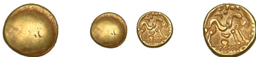
9 GALLO-BELGIC , Stater, series E [Ambiani], Gallic War uniface type, shallow dome with trace of rough fronds around, rev. stylised horse standing right, charioteer's arm above, complex exergue comprising corded line over row of linked annulets, 5.98g (LH 9, this coin ; ABC 16; VA 54-1; S 11). Very fine, well centred and with some toning £500-£700