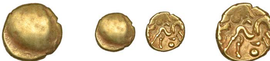
30 GALLO-BELGIC , Stater, series E [Ambiani], Gallic War uniface type, shallow dome, rev. stylised horse standing right, charioteer's arm above, 'coffee bean' and 'thunderbolt' behind, 5.98g (LH 30, this coin ; ABC 16; VA 54-1; S 11). A little off-centre, very fine £300-£400