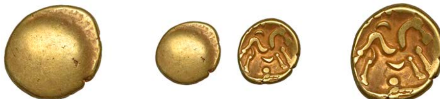
28 GALLO-BELGIC , Stater, series E [Ambiani], Gallic War uniface type, shallow dome, rev. stylised horse standing right, trace of charioteer's arm above, 5.89g (LH 28, this coin ; ABC 16; VA 54-1; S 11). About very fine £400-£600