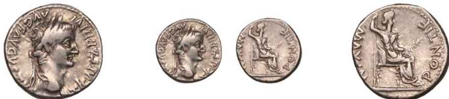
244 Denarius, Lugdunum, after AD 16, TI CAESAR DIVI AVG F AVGVSTVS around laureate head right, rev. PONTIF MAXIM around Livia as Pax, draped and seated right on chair with ornamented legs, feet on footstool, holding branch in left hand and sceptre in right, single line below, 3.83g/4h (Ghey 394.23, this coin ; BMC 48-60; RIC 30; RSC 16a). Good fine £100-£150