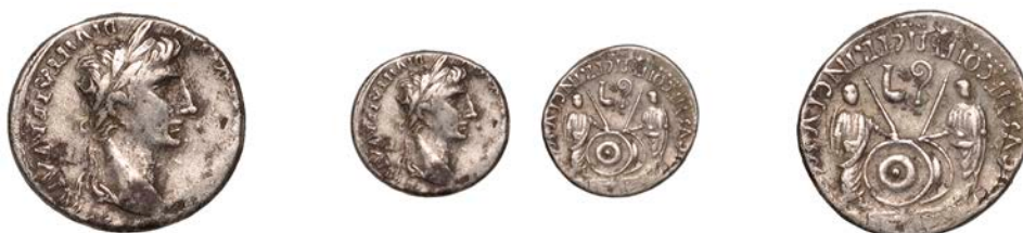
219 A Contemporary plated Denarius, after Lugdunum, 2 BC-AD 4, [-] DIVI F PATER PATR[-] around laureate head of Augustus right, rev. [-] in exergue, AVGVSTI F COT F F SIG PRINC IVVE[-] around Gaius and Lucius Caesar standing front, each togate and resting hand on shields, behind each is a spear upright, in field between simpulum left and lituus right, 3.33g/2h (Ghey 401, this coin ; cf. RIC 207). Struck slightly off-centre, otherwise good fine and interesting £40-£60