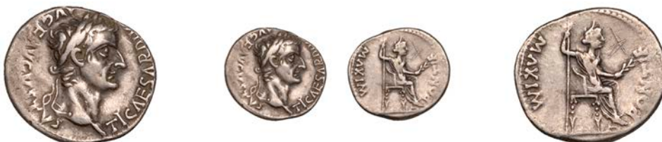
241 Denarius, Lugdunum, after AD 16, TI CAESAR DIV[-] AVG F AVGVSTVS around laureate Tiberius, rev. PONTIF MAXIM around Livia as Pax, draped and seated right on chair with ornamented legs, feet on footstool, holding branch in left hand and sceptre in right, single line below, 3.80g/12h (Ghey 394.26, this coin ; BMC 48-60; RIC 30; RSC 16a). Graffito to right of Livia's face, otherwise fine, portrait better and well struck up £90-£120