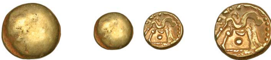
25 GALLO-BELGIC , Stater, series E [Ambiani], Gallic War uniface type, shallow dome, rev. stylised horse standing right, charioteer's arm above, 'thunderbolt' behind, 'coffee bean' and curve of pellets before horse's face, complex exergue comprising corded and pelleted lines, 5.96g (LH 25, this coin ; ABC 16; VA 54-1; S 11). Some die flaws on reverse, otherwise about very fine, coppery hoard patina £400-£600