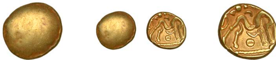
18 GALLO-BELGIC , Stater, series E [Ambiani], Gallic War uniface type, shallow dome, rev. stylised horse standing right, charioteer's arm above, 'coffee bean' and 'thunderbolt' behind, 5.91g (LH 18, this coin ; ABC 16; VA 54-1; S 11). Struck slightly off-centre, very fine, coppery hoard patina £300-£400