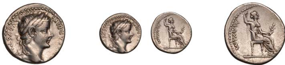
247 Denarius, Lugdunum, after AD 16, [-]AR DIVI AVG F AVGVSTVS around laureate head right, rev. [-] MAXIM around Livia as Pax, draped and seated right on chair with ornamented legs, feet on footstool, holding branch in left hand and sceptre in right, single line below, 3.89g/10h (Ghey 394.20, this coin ; BMC 48-60; RIC 30; RSC 16a). Good fine £100-£150