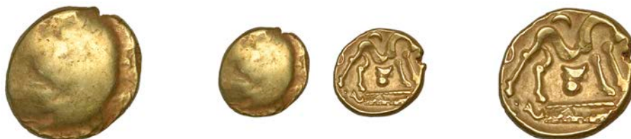
31 GALLO-BELGIC , Stater, series E [Ambiani], Gallic War uniface type, shallow dome with rough fronds around, rev. stylised horse standing right, trace of charioteer's arm above, complex exergue comprising corded line above row of linked annulets, floral motif below horse's hind legs, 6.03g (LH 31, this coin ; ABC 16; VA 54-1; S 11). Struck a little off-centre, otherwise very fine £400-£500