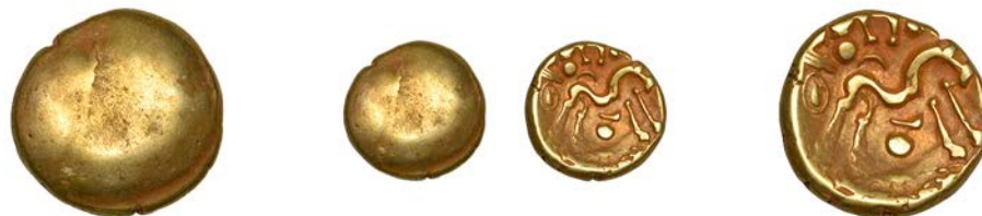
21 GALLO-BELGIC , Stater, series E [Ambiani], Gallic War uniface type, shallow dome, rev. stylised horse standing right, charioteer's arm above, 'coffee bean' and 'thunderbolt' behind, trace of complex exergue below, 5.90g (LH 21, this coin ; ABC 16; VA 54-1; S 11). Very fine, coppery hoard patina £400-£600