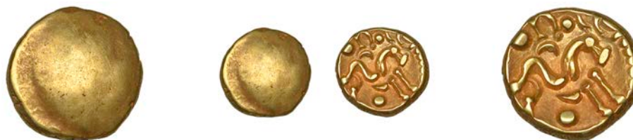
29 GALLO-BELGIC , Stater, series E [Ambiani], Gallic War uniface type, shallow dome, rev. stylised horse standing right, charioteer's arm above, 'coffee bean' and curve of pellets before horse's face, 6.03g (LH 29, this coin ; ABC 16; VA 54-1; S 11). Good very fine, coppery hoard patina £500-£700