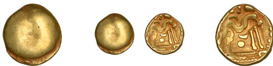
19 GALLO-BELGIC , Stater, series E [Ambiani], Gallic War uniface type, shallow dome, rev. stylised horse standing right, trace of charioteer's arm above, pellet below horse, complex exergue comprising corded line above three pelleted lines, floral ornament below horse's forefeet, 5.91g (LH 19, this coin ; ABC 16; VA 54-1; S 11). About very fine, coppery hoard patina £400-£600