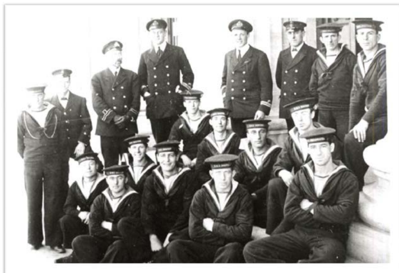
The crew of H.5 – Heath seated, second from right