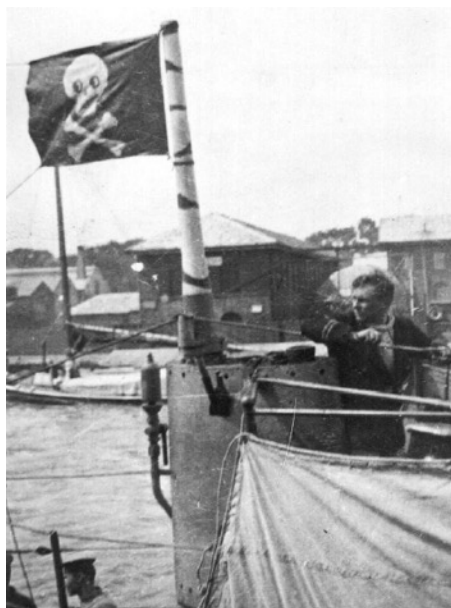
H.5 flies the 'Jolly Roger' on her return to Yarmouth after sinking the U-51 , the first such occasion to be captured on film