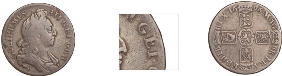
50 Crown , 1696, first bust, reads DEI GRA, edge OCTAVO (ESC 1000; S 3470). About fine, the error clear and very rare £200-£260