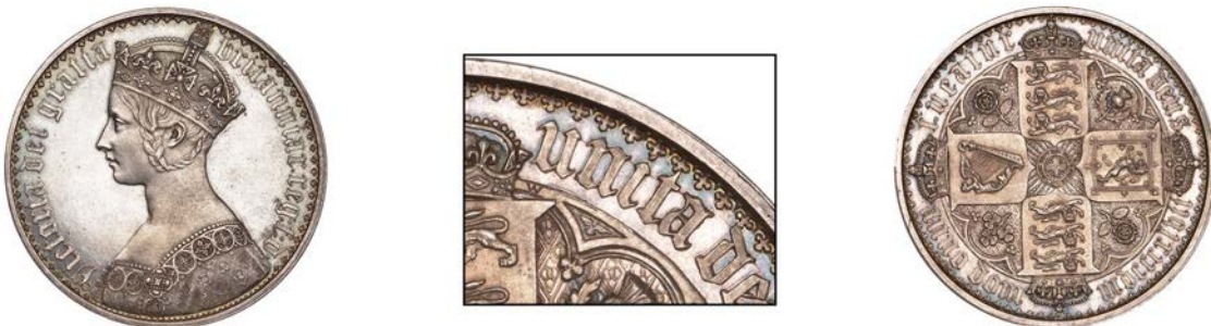
133 Proof Crown, 1847, struck in pure silver , VICTORIA DEI GRATIA BRITANNIAR REG: F: D:, 'Gothic' bust left, rev. TUEATUR UNITA DEUS ANNO DOM MDCCCLVII, crowned cruciform shield, N over inverted N in UNITA, edge plain, 27.98g/12h (L & S 58 var.; ESC 2578A; S 3883). Good extremely fine and extremely rare, the fields blue-toned and reflective but also lightly hairlined