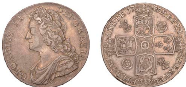
82 Crown, 1735, roses and plumes in angles, edge OCTAVO (ESC 1663; S 3686). Light adjustment marks and rim bruise on reverse, otherwise about very fine, mottled grey tone £600-£800