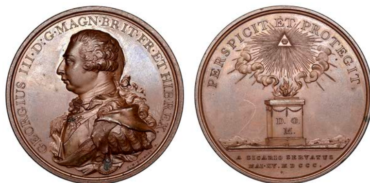
108 Preserved from Assassination, 1800 , a copper medal by C.H. Küchler, bust left, rev. burning altar, Eye of Providence above, 48mm (BHM 484; E 916). Minor stains on obverse, otherwise extremely fine with reflective fields £150-£200