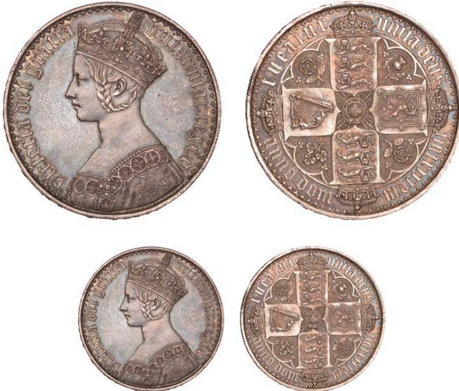
132 Crown, 1847, 'Gothic' bust left, rev. crowned cruciform shield, edge UNDECIMO (ESC 2571; S 3883). Good extremely fine and prettily toned, lightly hairlined and with a minute reverse edge bruise