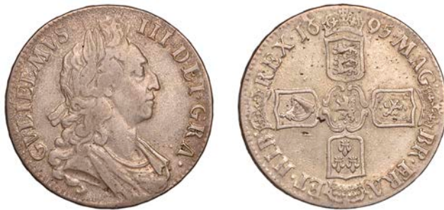
49 Crown , 1695, first bust, edge SEPTIMO with cinquefoil stops (ESC 990; S 3470). Fine but the reverse lightly cleaned £100-£150