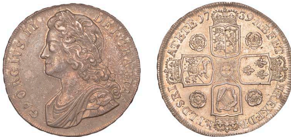
84 Crown, 1739, roses in angles, edge DVODECIMO (ESC 1665; S 3687). Good very fine with residual lustre £1,500-£2,000