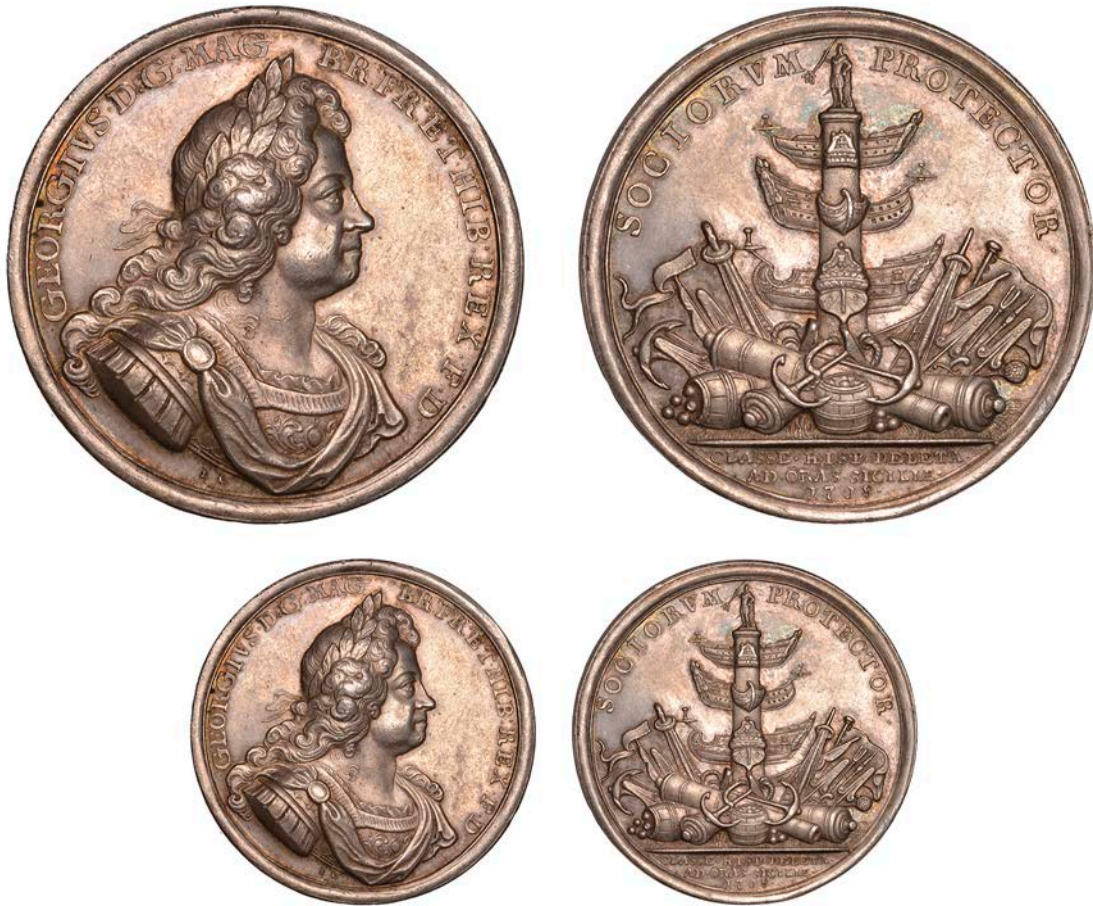
80 Spanish Fleet Destroyed off Cape Passaro, 1718 , a silver medal by J. Croker, laureate, draped and cuirassed bust of George I right, rev. King standing atop rostral column, naval trophies around, 45mm, 37.08g (MI II, 439/42; E 481). Fields marked but with some toning, good very fine £300-£400