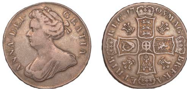
56 Crown, 1705, first bust, plumes in angles, edge QUINTO (ESC 1341; S 3577). Good fine, toned and scarce