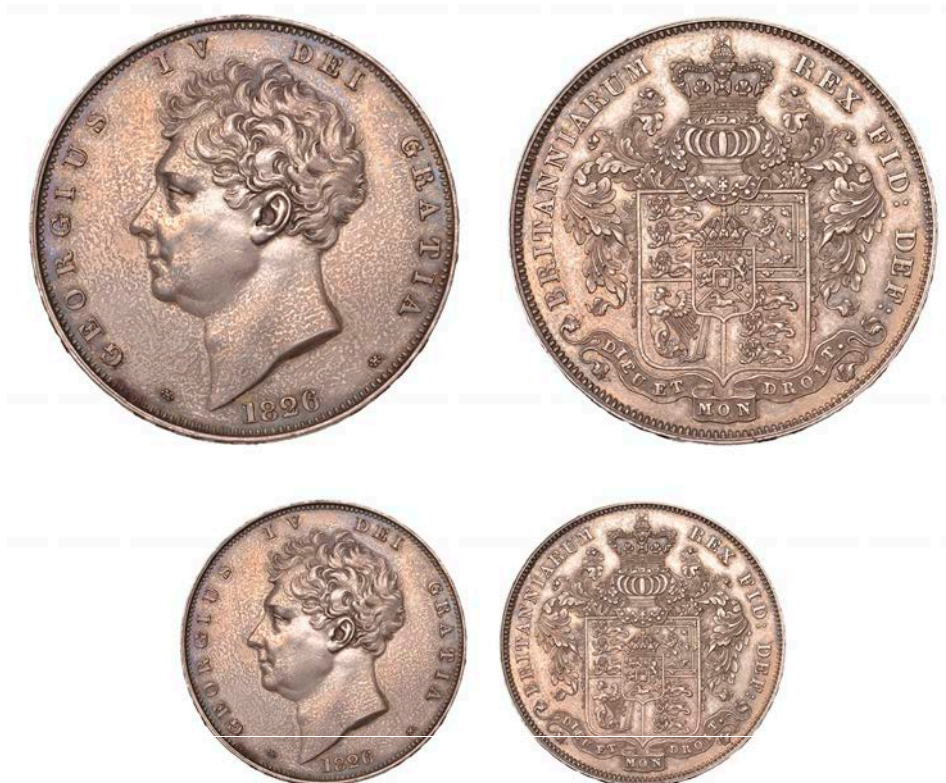
124 Proof Crown, 1826, *GEORGIUS IV DEI GRATIA*, bare head left, rev. BRITANNIARUM REX FID: DEF:, crowned helmet over square-topped shield of arms, edge engraved in relief DECUS ET TUTAMEN ANNO REGNI SEPTIMO, 28.29g/6h (L & S 28; ESC 2336; S 3806). Light rubbing on the king's cheek, otherwise extremely fine, speckled toning across bright obverse fields