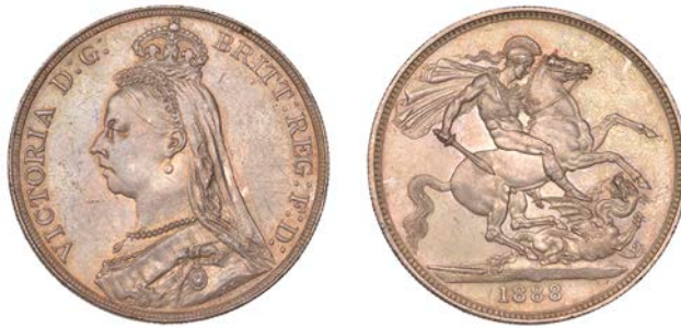
136 Crown, 1888, jubilee head, narrow date (ESC 2587; S 3921). Lightly bagmarked, otherwise good extremely fine, attractively toned