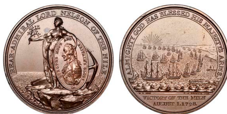
106 Battle of the Nile, 1798 , a copper medal by C.H. Küchler for Davison, Peace standing on rocky shore, holding medallion bearing bust of Nelson, anchor behind, rev. the British fleet heading into battle, edge inscribed, 47mm (BHM 447; E 890). Small reverse edge bruise at 3 o'clock, otherwise extremely fine and attractive £300-£400