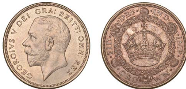
154 Crown, 1931 (ESC 3639; S 4036). Extremely fine, grey toned