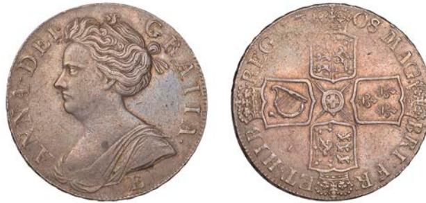
60 Crown, 1708/7E, second bust, edge SEPTIMO with M over E (ESC 1355; S 3600). Concentrated scratches on reverse in second quarter, otherwise very fine, toned and scarce