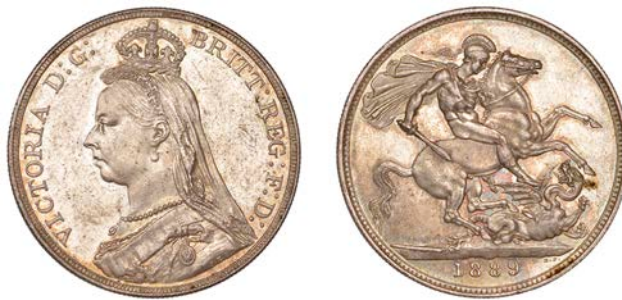
137 Crown, 1889, jubilee head, (ESC 2589; S 3921). Extremely fine, lightly toned over bright, reflective fields