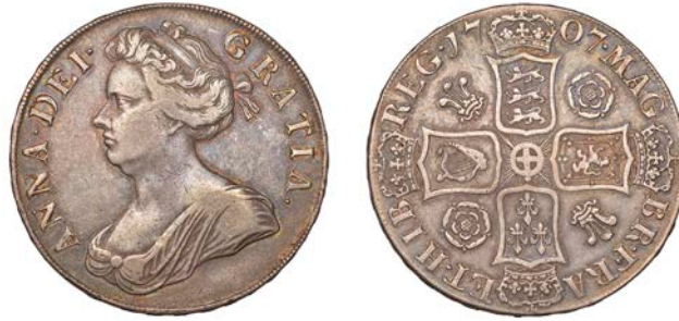
58 Crown, 1707, roses and plumes in angles, edge SEXTO (ESC 1343; S 3578). About very fine, blue-grey toning Provenance: Bt Seaby November 1964