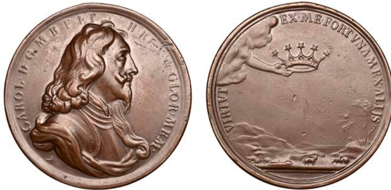
20 Memorial , a cast copper medal after J. & N. Roettier, undated, armoured and draped bust right, rev. hand issuing from heaven holding celestial crown, landscape below, 50mm (cf. E 162a). Very fine, much as made £20-£30