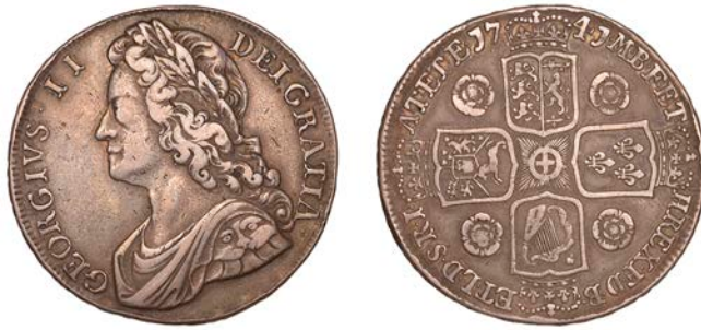
85 Crown, 1741, roses in angles, edge DECIMO QVARTO (ESC 1666; S 3687). Good fine, grey toned