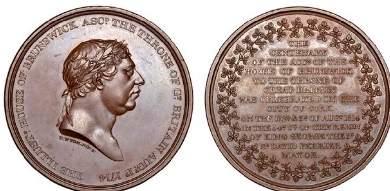
117 Centenary of the Accession of the House of Brunswick , 1814, a copper medal by T. Wyon Jr., laureate bust of George III right, rev. legend within shamrock wreath, 50mm (BHM 780). About extremely fine