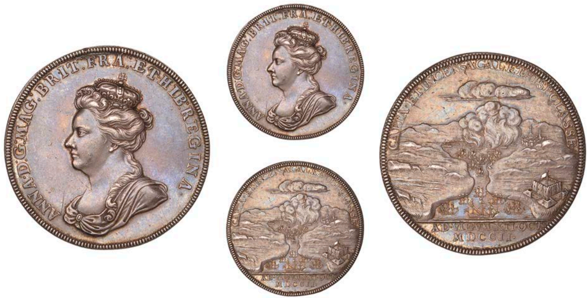
66 Expedition to Vigo Bay, 1702 , a silver medal, unsigned [by J. Croker], crowned bust of Anne left, rev. ships burning in blockaded harbour, English fleet beyond, 37mm, 18.15g (MI II, 236/18; E 395a). A few scattered marks, otherwise good very fine and attractively toned £400-£500