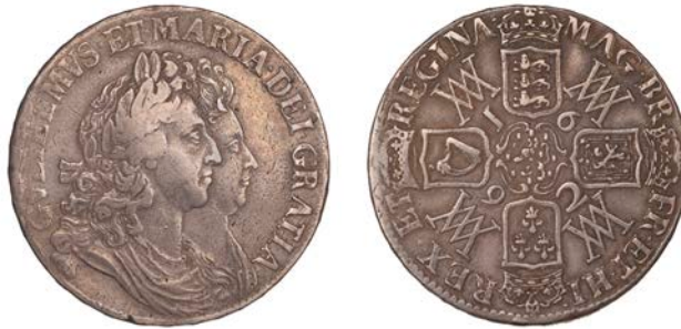
46 Crown, 1692, edge QVARTO (ESC 822; S 3433). Minor rim mark at 6 o'clock, otherwise good fine