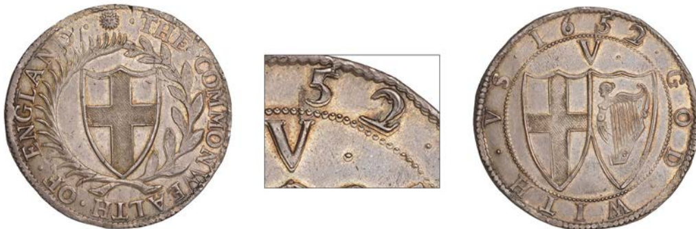
21 Crown , 1652/1, mm. sun on obv. only, THE . COMMONWEALTH . OF . ENGLAND around St. George's shield within wreath, rev. GOD . WITH . VS . around conjoined shields and denomination mark, 30.04g/6h (ESC 5; N 2721; S 3214). Good extremely fine, struck on a neat round flan with pretty golden toning over lustrous surfaces; the over-date clear, extremely rare thus £6,000-£8,000