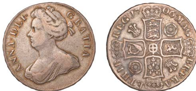
57 Crown, 1706, first bust, roses and plumes in angles, edge QUINTO (ESC 1342; S 3578). Good fine, peripheral toning