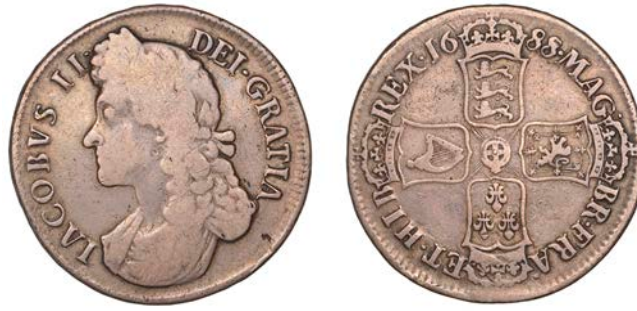
45 Crown, 1688/87, second bust, edge QVARTO (ESC 747; S 3407). About fine