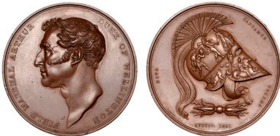
147 Wellington Laudatory Medal , 1841, a copper medal by B. Pistrucci, bare head left, rev. Corinthian helmet decorated with classical scenes, edge plain, 61mm (BHM 2011; E 1353). About extremely fine