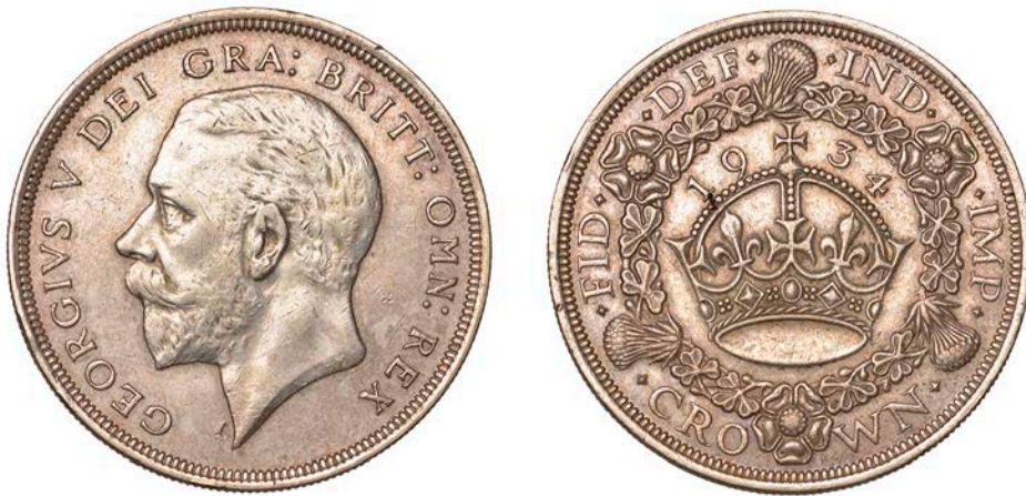
157 Crown, 1934 (ESC 3647; S 4036). Very fine and rare