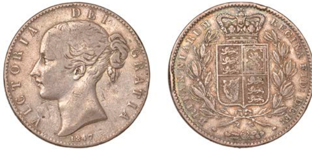
131 Crown, 1847, young head, edge xi, reads FT for ET (ESC 2567; S 3882). About fine, some smoothing, rare