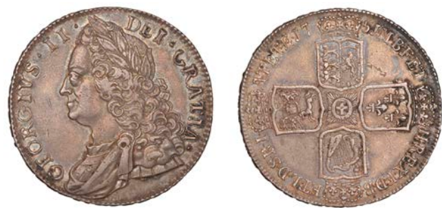
88 Crown, 1751, old head, edge VICESIMO QVARTO (ESC 1671; S 3690). Several scratches and light surface deposits, very fine and toned