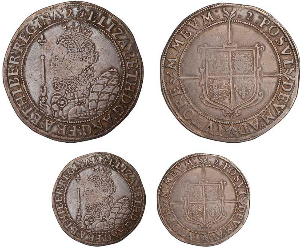
5 Seventh issue, Crown, mm. 2 [1602], bust 9A, sceptre to l of REGINA, 29.99g/8h (BCW 2-1:2-a; FRC dies G-8 [Sale, lot 14]; N 2012; S 2582A). Good fine and very rare, dark cabinet tone £3,000-£3,600