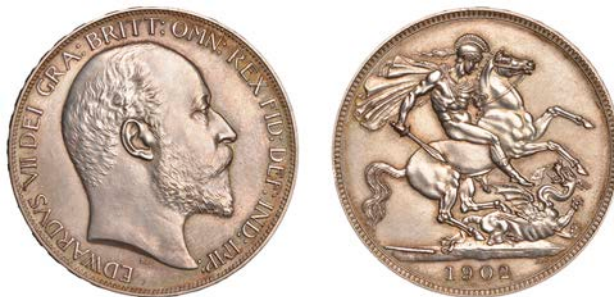
148 Proof Crown, 1902, edge II (ESC 3562; S 3979). Impaired by cleaning, otherwise extremely fine