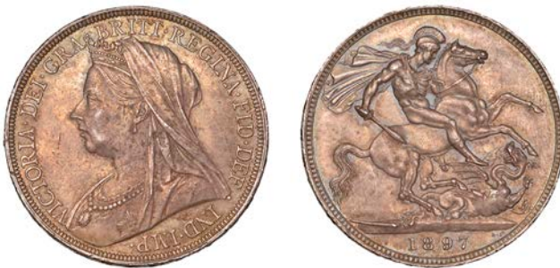
141 Crown, 1897, old head, edge LX (ESC 2601; S 3937). Good very fine, the reverse a little better, some staining on obverse