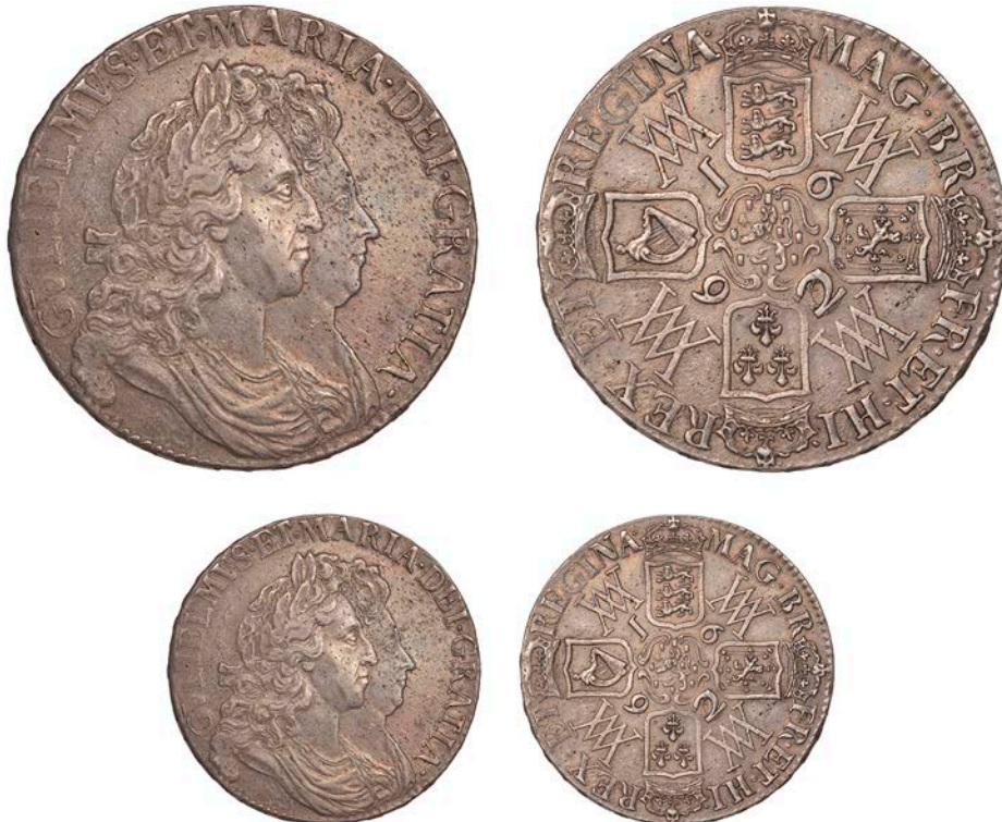
47 Crown, 1692, 2 over inverted 2, edge QVINTO (ESC 824; S 3433). Light haymarking, otherwise good very fine and attractively toned