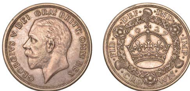
150 Proof Crown, 1927 (ESC 3631; S 4036). Impaired from being a pocket piece, very fine and grey toned