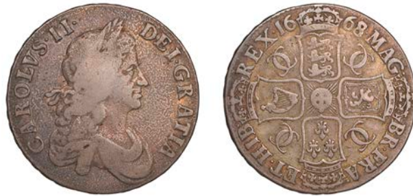
33 Crown, 1668/7, second bust, edge VICESIMO (ESC 376; S 3357). About fine, dark toned £100-£150