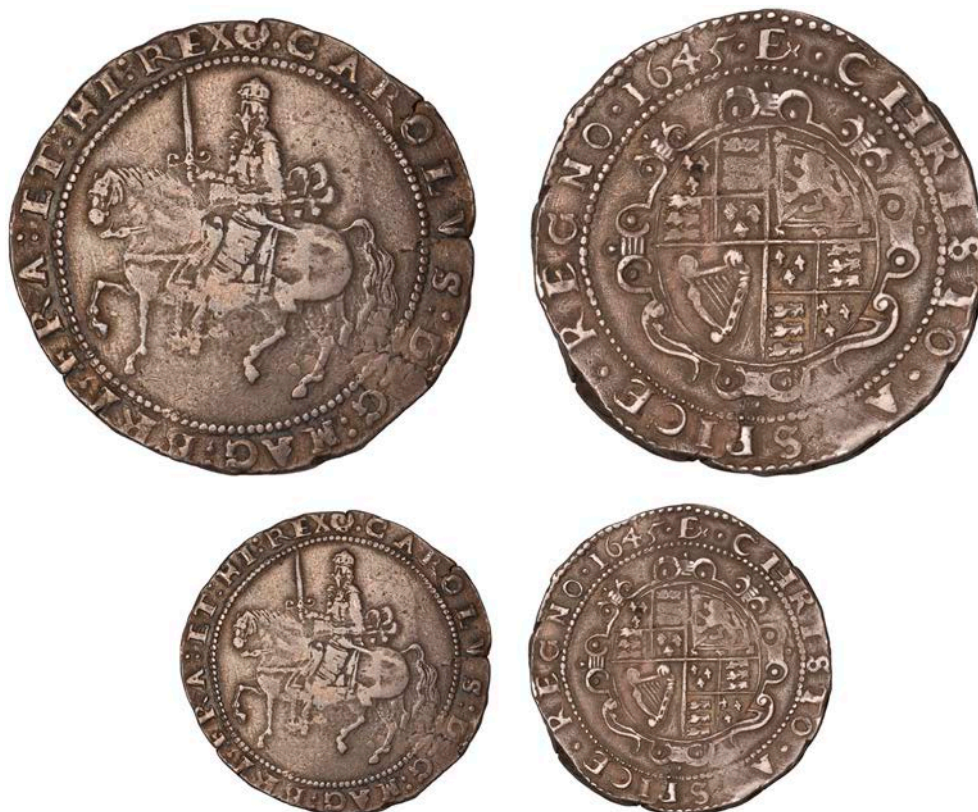
18 Exeter mint, Crown, 1645, mm. rose on obv., Ex on rev., tall horseman with sash tied in bow, 28.96g/3h (Besly C16; SCBI Brooker 1036-7; N 2558; S 3059). Very fine and rare, old cabinet tone £900-£1,200

Provenance: Spink Auction 82, 27 March 1991, lot 131