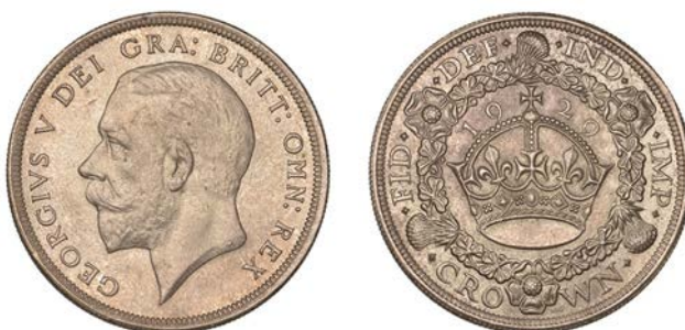
152 Crown, 1929 (ESC 3636; S 4036). Minute rim nick, otherwise good extremely fine, olive grey toning over bright fields