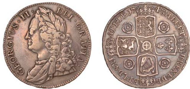
86 Crown, 1743, old head, roses in angles, edge DECIMO SEPTIMO (ESC 1667; S 3688). Shallow hole drilled in edge at 12 o'clock and with faint graffiti in obverse field, otherwise about very fine