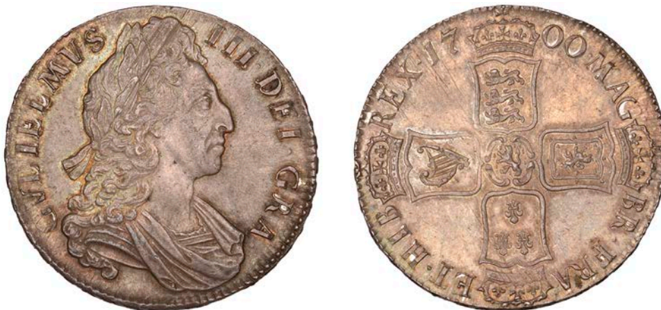
53 Crown, 1700, third bust variety, edge DVODECIMO (ESC 1010; S 3474). Some adjustment marks, better than extremely fine and attractively toned