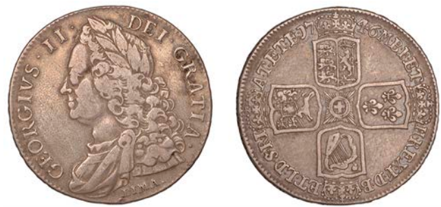
87 Crown, 1746 LIMA, old head, edge DECIMO NONO (ESC 1668; S 3689). Fine, reverse better