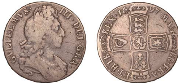
52 Crown, 1697, third bust, edge NONO (ESC 1009; S 3473). About fine, extremely rare