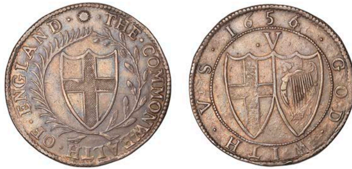
23 Crown, 1656/4, mm. sun on obv. only, small 6s in date, THE . COMMONWEALTH . OF . ENGLAND around St. George's shield within wreath, rev. GOD . WITH . VS . around conjoined shields and denomination mark, 29.80g/12h (ESC 11; N 2721; S 3214). The over-date clear; very fine with blue-grey toning £2,000-£2,600