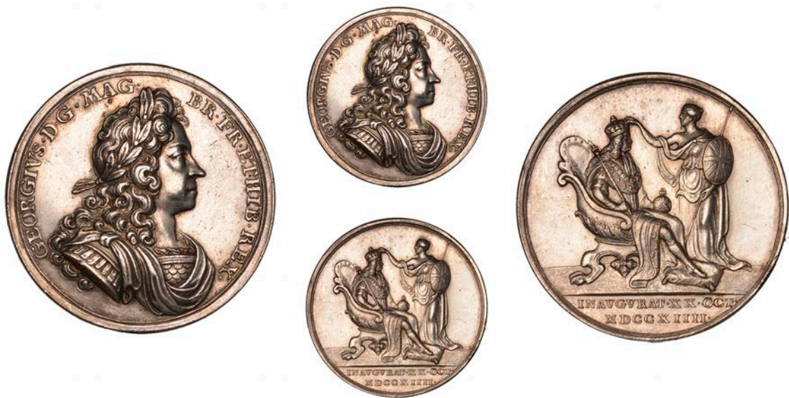
79 Coronation, 1714, a silver medal by J. Croker, laureate bust right, rev. Britannia crowning King, 34mm, 17.20g (MI II, 424/9; E 470). Brushed, about extremely fine £150-£200