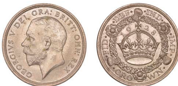
151 Crown, 1928 (ESC 3633; S 4036). Extremely fine, grey toned with residual mint bloom