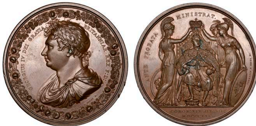
126 Coronation , 1821, a copper medal by Thomason & Jones, laureate and draped bust left within wreath, rev. king enthroned facing, being crowned by Britannia, Scotia and Hibernia, 54mm (BHM 1091; E 1143). Surface staining, extremely fine £60-£80