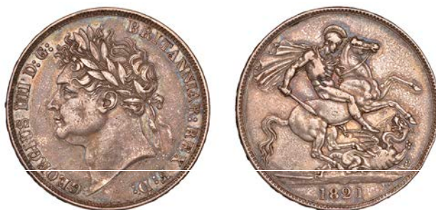
123 Crown, 1821, edge SECUNDO (ESC 2310; S 3805). Very fine, dulled surfaces