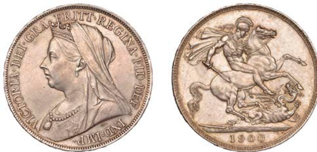
146 Crown, 1900, old head, edge LXIV (ESC 2609; S 3937). About extremely fine