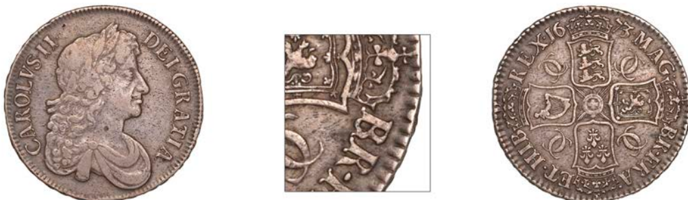
35 Crown, 1673, third bust, B over R in BR, edge VICESIMO QVINTO (ESC 391; S 3358). About very fine, light haymarking below grey tone; the variety very rare £400-£500

Provenance: SNC December 2000 (MS0001); E.D.J. van Roekel Collection, Spink Auction 156, 15 November 2001, lot 118