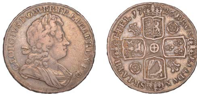
78 Crown, 1726, roses and plumes, edge DECIMO TERTIO, NS on edge inverted (ESC 1548; S 3639A). 'A-J' scratched below bust and small cross scored on reverse, otherwise good fine, the edge variety very rare £700-£800