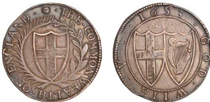
22 Crown , 1653, mm. sun on obv. only, THE . COMMONWEALTH . OF . ENGLAND around St. George's shield within wreath, rev. GOD . WITH . VS . around conjoined shields and denomination mark, 30.18g/7h (ESC 6; N 2721; S 3214). Good fine, mottled patina £1,500-£2,000