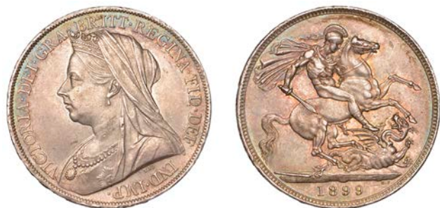
143 Crown, 1899, old head, edge LXII (ESC 2606; S 3937). Good very fine, lightly toned

Provenance: Spink Auction 89, 25 November 1991, lot 157 (part)