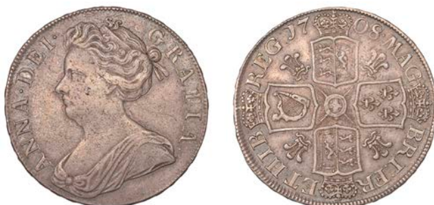
62 Crown, 1708, plumes in angles, edge SEPTIMO (ESC 1347; S 3602). Haymarked and with a small scratch behind queen's neck, otherwise about very fine, dark toned