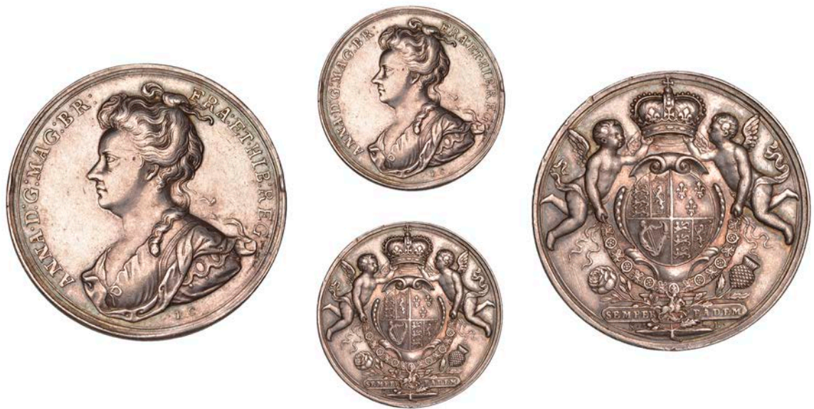
70 Union of England and Scotland , [1707], a silver medal, obv. unsigned [by J. Croker?], rev. by S. Bull, draped bust of Anne left, rev. arms of Britain flanked by two infant genii holding crown and Garter collar, 35mm, 14.93g (MI II, 297/113; E 425). Obverse cleaned, better than very fine £120-£150