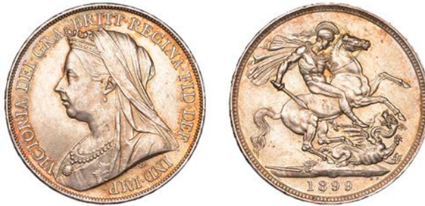
144 Crown, 1899, old head, edge LXIII (ESC 2607; S 3937). Lightly cleaned, about extremely fine Provenance: Spink Auction 89, 25 November 1991, lot 157 (part)