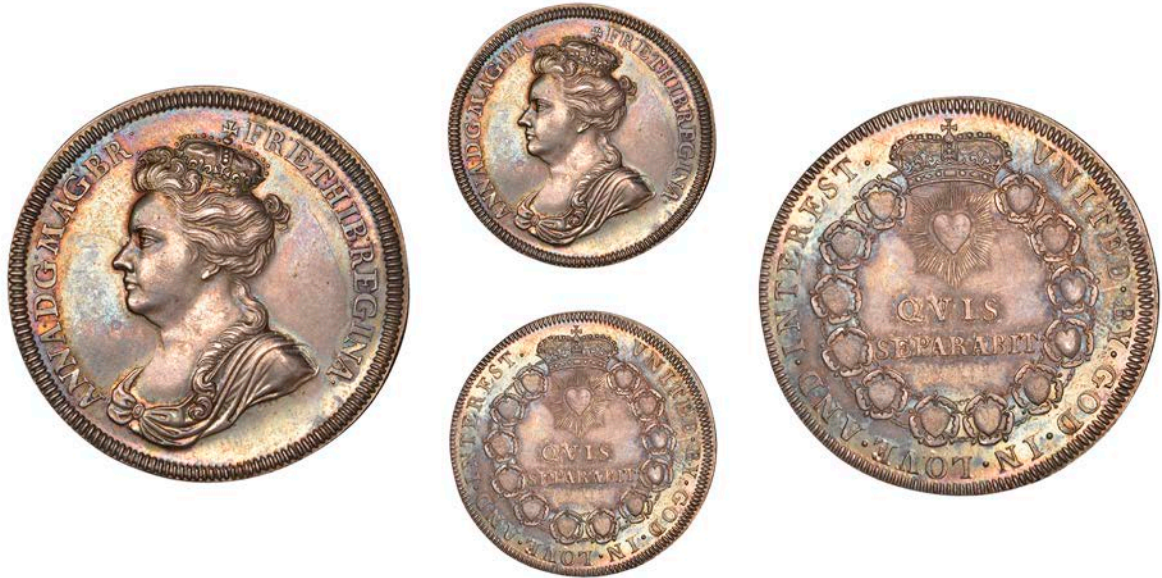
64 Accession , 1702, a silver medal, unsigned [by J. Croker], crowned bust of Anne left, rev. radiate heart within a crowned chain of hearts and roses, 35mm, 15.57g (MI II, 228/3; E 388). About extremely fine and iridescently toned, a few light hairlines £120-£150