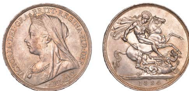
138 Crown, 1894, old head, edge LVII (ESC 2596; S 3937). Extremely fine, lightly toned