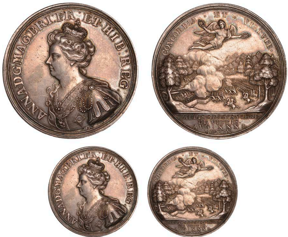
71 Battle of Malplaquet , 1709, a silver medal by J. Croker, crowned bust of Anne left, rev. view of the battle, Victory flying above holding two laurel wreaths, 47mm, 38.75g (MI II, 359/197; E 438). Surface marks and light hairlines, good very fine £200-£260