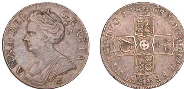
61 Crown, 1708/7E, second bust, edge SEPTIMO with M over E (ESC 1355; S 3600). Numerous scratches below grey tone, about very fine