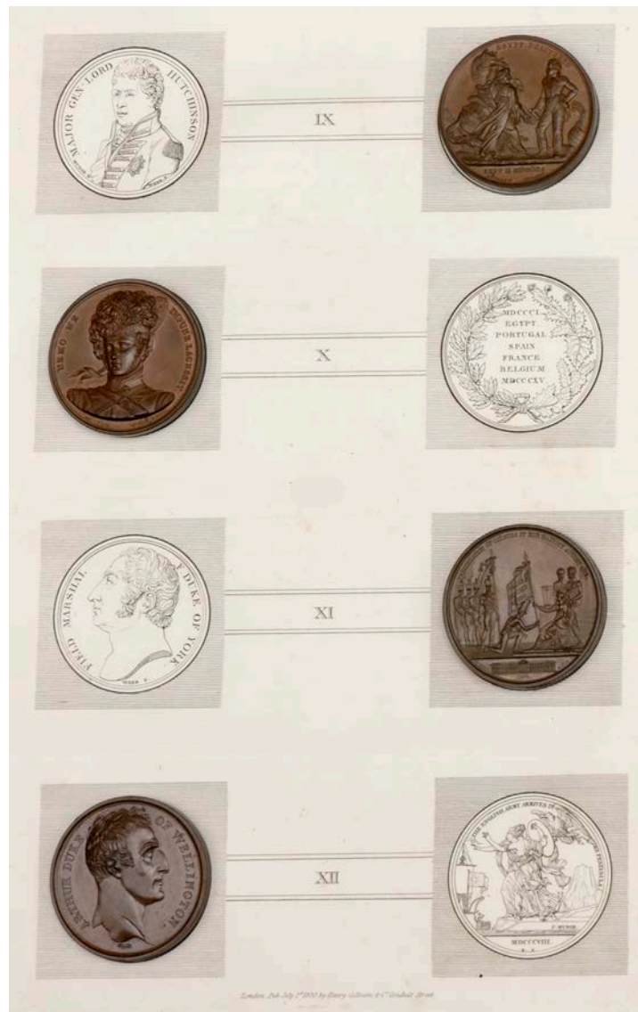
122 Mudie's National Medals , 1820, a set of 40 copper medals by J. Mudie for Thomason, covering events from Admiral Duncan's Victory at Camperdown, 1797, to the Ionian Islands, 1817 (BHM 1057; E 1136); housed in the fitted book-like case of issue, together with a small folio book, An Historical and Critical Account of a Grand series of National Medals , published under the direction of James Mudie, Esq., London, 1820, 151pp, 10 plates [Lot]. Library case in good original condition, medals mostly extremely fine or better, book internally in good order but front cover a little scuffed, rare as a complete original set £1,500-£2,000