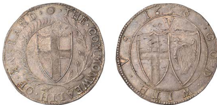
24 Crown, 1656, mm. sun on obv. only, THE . COMMONWEALTH . OF . ENGLAND around St. George's shield within wreath, rev. GOD . WITH . VS . around conjoined shields and denomination mark, 29.71g/1h (ESC –; N 2721; S 3214). Some surface crazing and a little softly struck on a neat, round flan, good very fine and lightly toned £3,000-£3,600

Provenance: H. Emory Collection, Spink Auction 84, 21 May 1991, lot 147