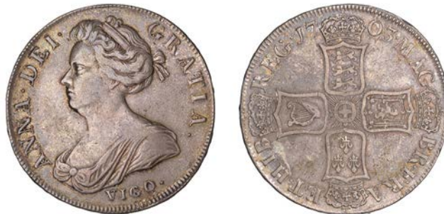
55 Crown, 1703 VIGO, first bust, edge TERTIO (ESC 1340; S 3576). Sometime cleaned and now grey-toned, minute edge bruise, about very fine