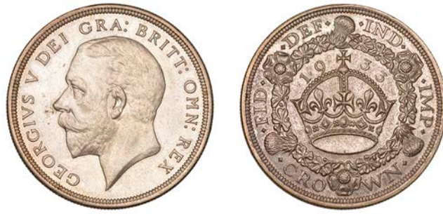
156 Crown, 1933 (ESC 3644; S 4036). Good extremely fine, the fields bright and attractive