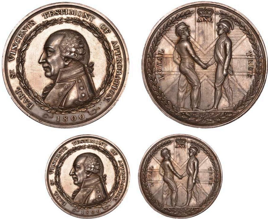
107 Earl St. Vincent's Testimony of Approbation, 1800 , a silver award medal by C.H. Küchler, uniformed bust left, hair tied in a queue, rev. sailor and marine clasp hands, 47mm, 24.09g (BHM 489; E 919; Pollard 19). Tooled in obverse field, otherwise good very fine and very rare £200-£260