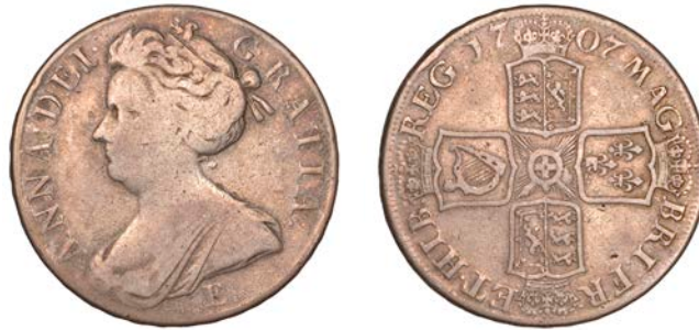
59 Crown, 1707E, edge SEXTO (ESC 1352; S 3600). Fair to fine