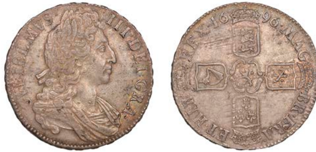
51 Crown, 1696, third bust, edge OCTAVO (ESC 1004; S 3472). Good very fine, adjustment marks below grey tone