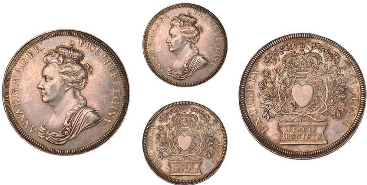
65 Accession , 1702, a silver medal, unsigned [by J. Croker], crowned bust of Anne left, rev. a heart within two oak branches tied at the bottom and supporting crown above, all set upon altar inscribed ATAVIS REGIBVS, 36mm, 15.90g (MI II, 227/1; E 388). Sometime wiped and now grey toned, good very fine £150-£200