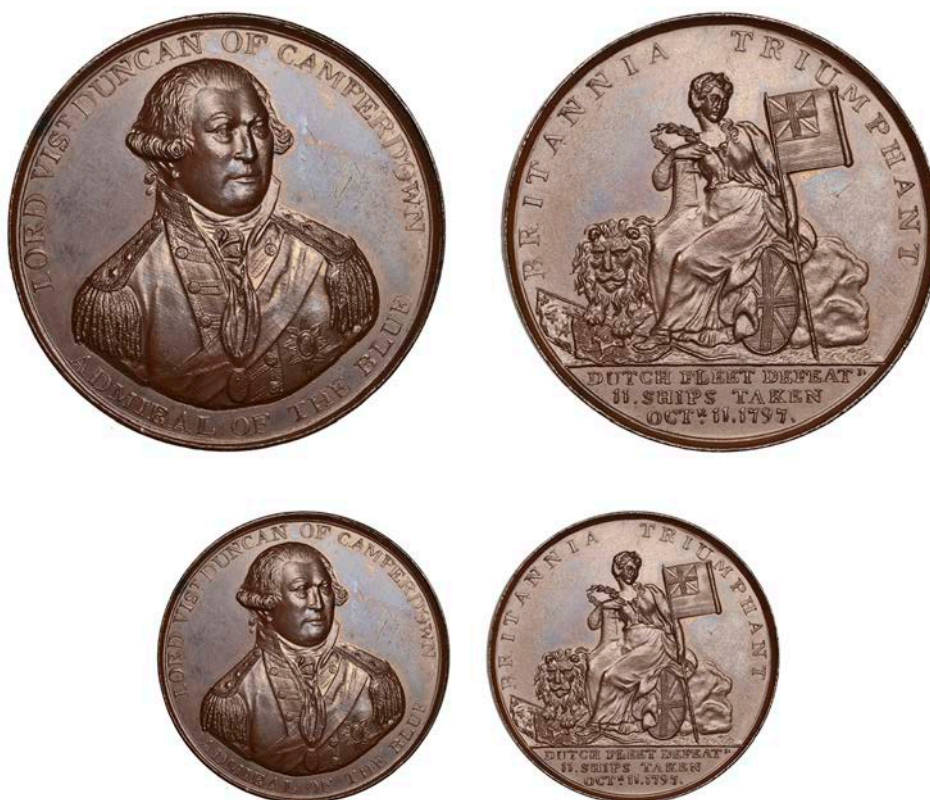
105 Battle of Camperdown, 1797 , a copper medal, unsigned [by T. Wyon], bust of Lord Viscount Duncan half right, rev. Britannia seated, lion at her side, 38mm (BHM 428; E 887). Extremely fine £40-£50