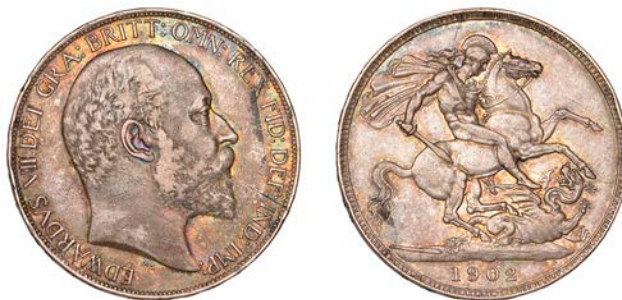
149 Crown, 1902, edge II (ESC 3560; S 3978). Good fine, reverse better