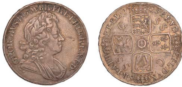
77 Crown, 1723 SSC, edge DECIMO (ESC 1545; S 3640). Score before the king's nose and with several large rim bruises on reverse, otherwise very fine, mottled grey patina £300-£400