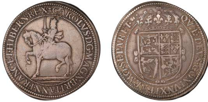
19 Scotland , Third coinage, Briot's issue [1637-42], Sixty Shillings, mm. thistle, signed v both sides, 29.65g/6h (SCBI 35, 1424-6; B 5, fig. 1005; S 5552). Good fine, toned £900-£1,200