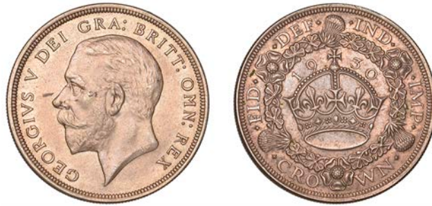
153 Crown, 1930 (ESC 3638; S 4036). Obverse lightly wiped, about extremely fine and toned