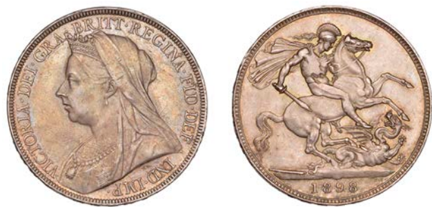
142 Crown, 1898, old head, edge LXII (ESC 2605; S 3937). Almost extremely fine, grey toned with some iridescence