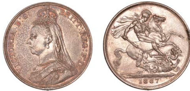
135 Crown, Jubilee head, 1887 (ESC 2585; S 3921). Sometime cleaned and now toned, extremely fine