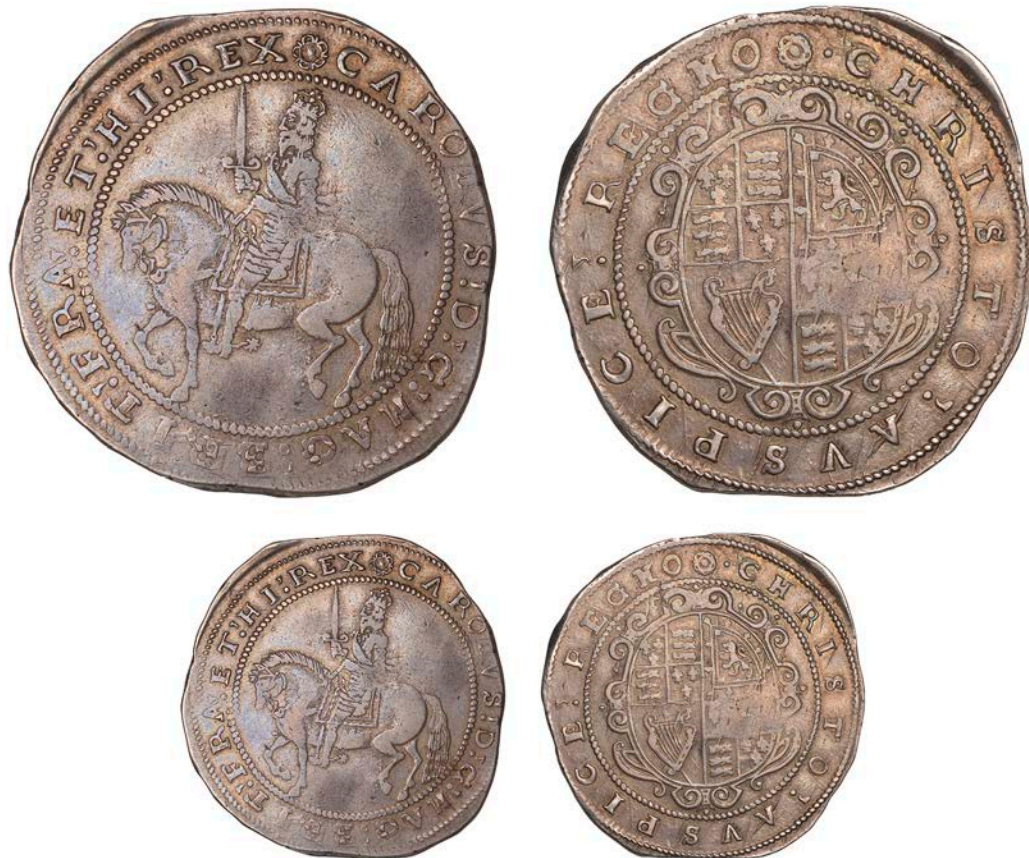
17 Truro mint, Crown, mm. rose [1642-3], tall upright horseman, 28.29g/6h (Besly A1; SCBI Brooker 1008-9, same dies; N 2531; S 3045). About very fine, golden-grey toning across a broad flan £700-£900

Provenance: Spink Auction 82, 27 March 1991, lot 131