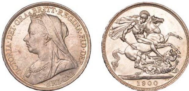
145 Crown, 1900, old head, edge LXIII (ESC 2608; S 3937). Lightly bagmarked, extremely fine and grey toned Provenance: Spink Auction 82, 27 March 1991, lot 181