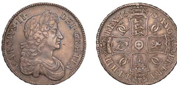
36 Crown, 1678/7, third bust, edge TRICESIMO (ESC 402; S 3358). Light scratch in obverse field, otherwise very fine with rich cabinet tone, rare thus £600-£800

Provenance: SNC December 2000 (MS0001); E.D.J. van Roekel Collection, Spink Auction 156, 15 November 2001, lot 118