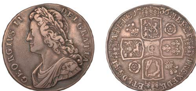
83 Crown, 1736, roses and plumes in angles, edge NONO (ESC 1664; S 3686). Good fine, dark toned £500-£600