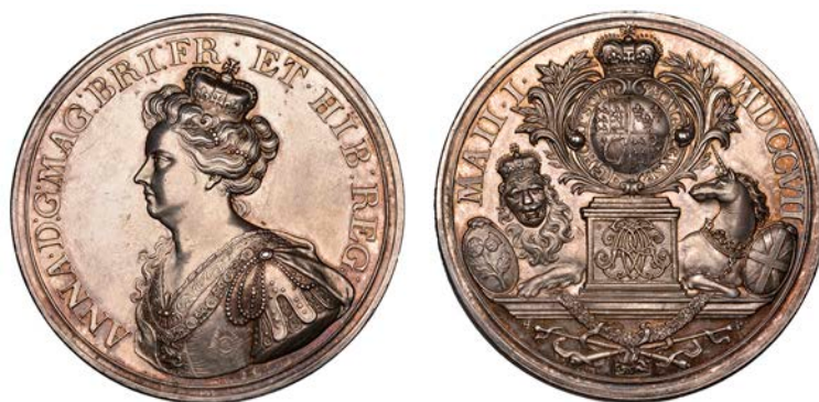
69 Union of England and Scotland , 1707, a silver medal by J. Croker, crowned bust of Queen Anne left, rev. crowned shield within Garter on plinth, lion and unicorn supporters below, 47mm, 41.30g (MI II, 295/107; E 424a). Obverse polished, good very fine, reverse better £300-£400