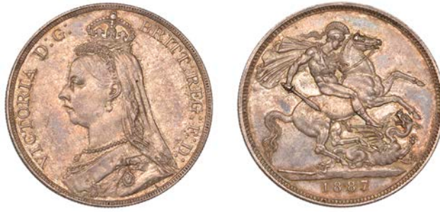
134 Crown, Jubilee head, 1887 (ESC 2585; S 3921). Extremely fine