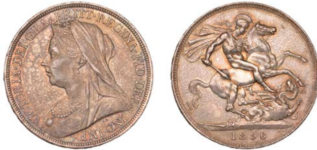
140 Crown, 1896, old head, edge LX (ESC 2601; S 3937). Good very fine, toned