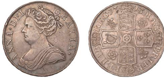
63 Crown, 1713, third bust, roses and plumes in angles, edge DVODECIMO (ESC 1349; S 3603). Minute edge bruise and light haymarking, otherwise very fine, grey cabinet tone £500-£600