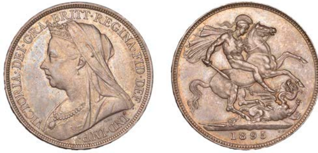
139 Crown, 1895, old head, edge LIX (ESC 2599; S 3937). Good very fine, attractively toned