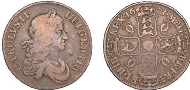
34 Crown, 1671, second bust, edge VICESIMO TERTIO (ESC 382; S 3357). Fine £100-£150