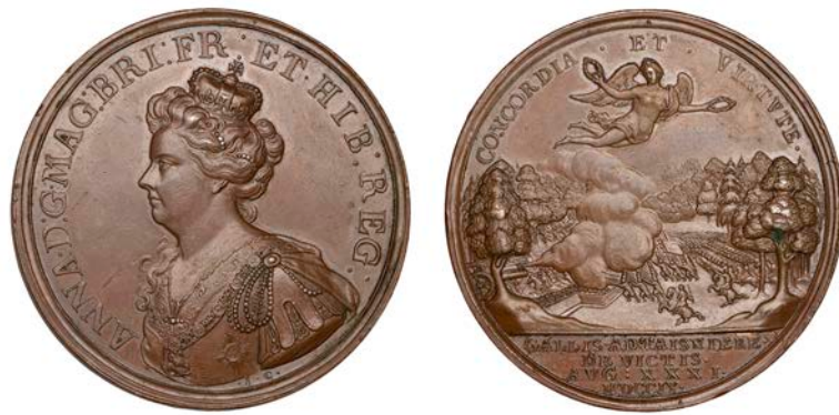
72 Battle of Malplaquet , 1709, a copper medal by J. Croker, crowned bust of Anne left, rev. view of the battle, Victory flying above holding two laurel wreaths, 47mm, (MI II, 359/197; E 438). About extremely fine £60-£80