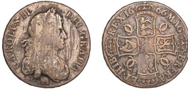
32 Crown, 1666, second bust with elephant below, reads RE.X, edge ANNO REGNI XVIII (ESC 369; S 3356). Surfaces stained, about fine and rare £400-£500