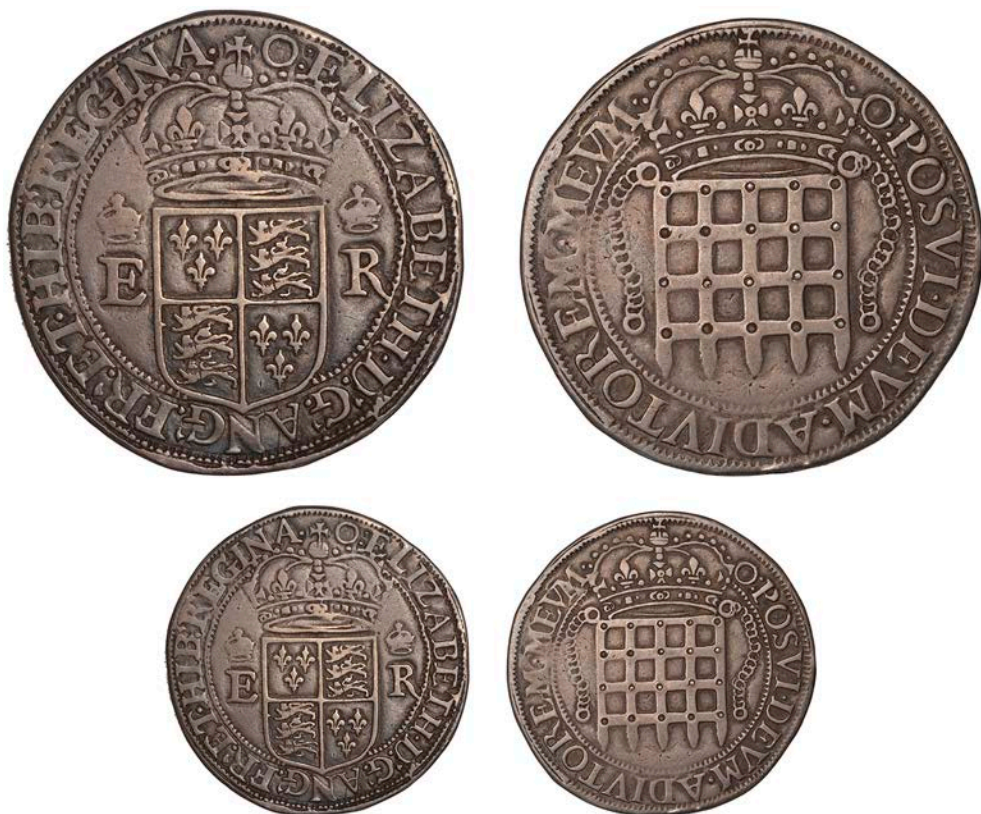
6 East India Company , Portcullis issues, Eight Testerns or Dollar, mm. O [1600/01], crowned arms dividing crowned E R, rev. crowned portcullis, 26.72g/5h (Prid. 1; BCW 1C; same dies as Cooper 137, Comber 89, Whetmore 12 and Carlborn 903; S 2607A). Some weakness at 9 o'clock on obverse (and corresponding on reverse), otherwise about very fine and toned £5,000-£6,000