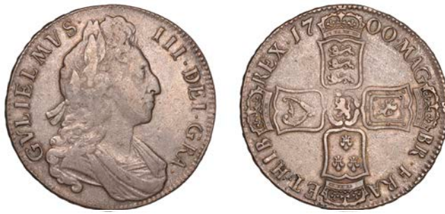
54 Crown, 1700, third bust variety, edge DECIMO TERTIO (ESC 1011; S 3474). About fine, the edge variety rare