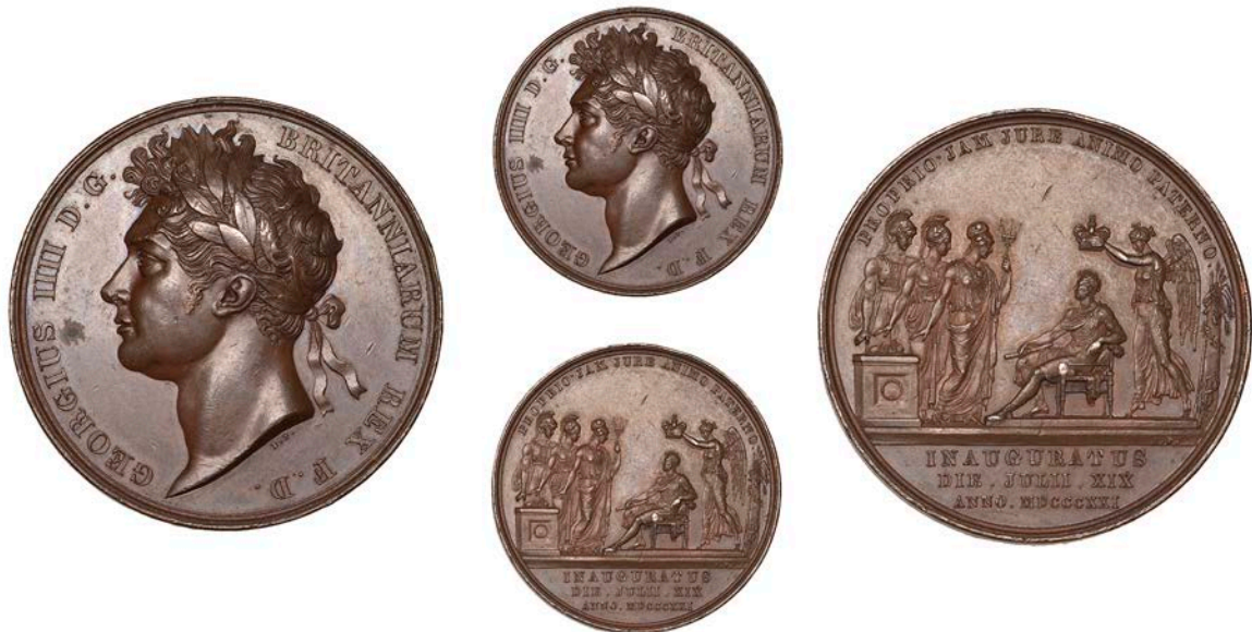
125 Coronation , 1821, a copper medal by B. Pistrucci, laureate head left, rev. Britannia, Scotia and Hibernia approaching the enthroned King being crowned by Victory, 35mm (BHM 1070; E 1146a). Good very fine £40-£50