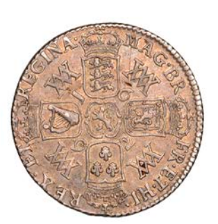
58 Shilling, 1692, AT over TI in GRATIA, stop after GRATIA, no stop after BR, harp with 7 strings (ESC 866; S 3437). Nearly very fine, rare £300-£400