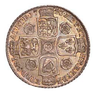
190 Shilling, 1743, roses, 4 of date over 3 (?) (ESC 1720 var.; $ 3702). About extremely fine and toned, the overdate apparently unpublished £400-£500

191 Shillings (2), both 1745/3, roses (ESC 1723; S 3702) [2]. One ex-mount, both fair