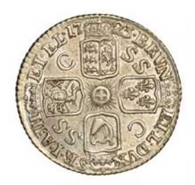
199 Sixpence, 1723 ss c, larger lettering (ESC 1614; S 3652). Obverse nearly extremely fine with some surface marks, reverse better £200-£240