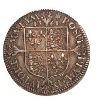
A Fine Selection of Milled Sixpences from the 'Covent Garden' Collection

110 Milled coinage, Sixpence, 1561, mm. star, bust A, decorated dress, large rose, 3.06g/6h (Borden/Brown 21, O1/R2; N 2024; S 2593). Minor die rust spots in obverse field, otherwise nearly extremely fine and attractively toned £600-£800