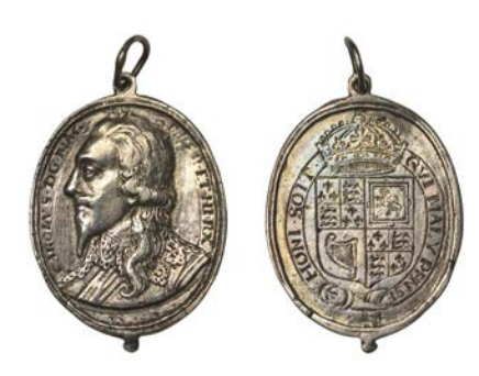
563 Charles I, a cast and chased silver Royalist badge by T. Rawlins, large bare-headed bust left with falling lace collar, CAROLVS D G MAG BRI FR ET HI RX, rev. crowned royal arms within garter, 30 x 23mm, 4.68g (Platt I, p.179, type B; MI I, 361/234). Very fine; with loop for suspension