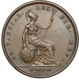
269 Penny, 1831, .w.w on truncation (BMC 1458; S 3846). Very fine with brown patina