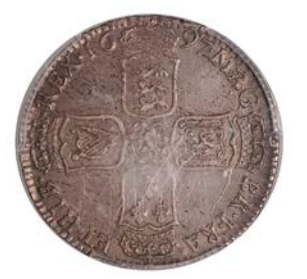
185 Halfcrown, 1697N, large shields, later harp, edge NONO (ESC 1091; S 3491). Good very fine, grey tone [slabbed PCGS XF 45] £500-£700