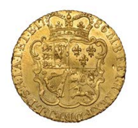
216 Half-Guinea, 1787, fifth bust (EGC 827; S 3734). Slightly uneven flan with obverse scratching, otherwise good very fine