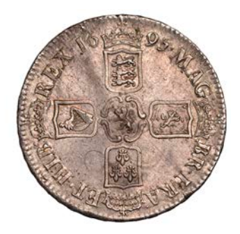
183 Crown, 1695, first bust, edge SEPTIMO (ESC 990; S 3470). Lightly toned in patches, obverse possibly once cleaned, good very fine £300-£400