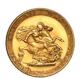
246 Sovereign, 1820, open 2 (M 4; S 3785C). Lightly wiped, a few surface marks, otherwise extremely fine