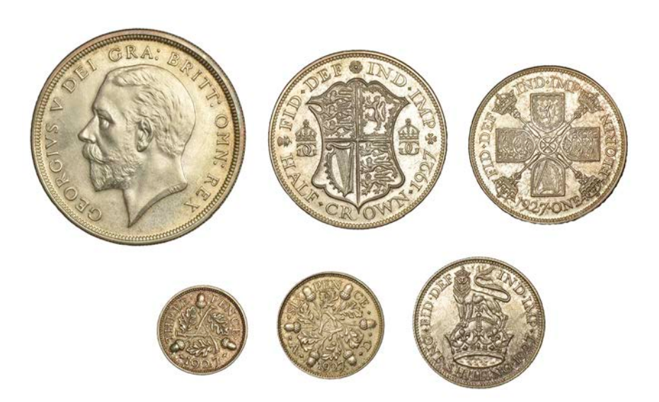
328 Proof Set, 1927, Crown to Threepence [6]. Toned and extremely fine