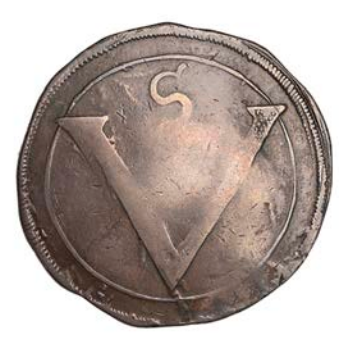
465 Crown, c. 1643, 29.48g/5h (DF 291; S 6544). Toned, good fine for issue and rare Provenance : H.A. Parsons Collection, Glendining & Co. Auctions, 11 May 1954, lot 830