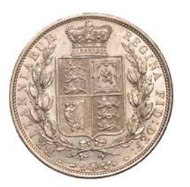
299 Halfcrown, 1883 (ESC 2762; S 3889). Better than extremely fine