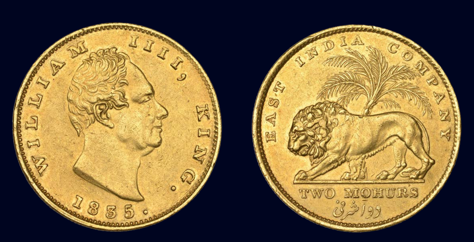
WILLIAM IV, GOLD 2 MOHURS, 1835, CALCUTTA ESTIMATE £15,000-£20,000

ALL ENQUIRIES PLEASE CONTACT PETER PRESTON-MORLEY ON 020 7016 1700 OR EMAIL COINS@NOONANS.CO.UK