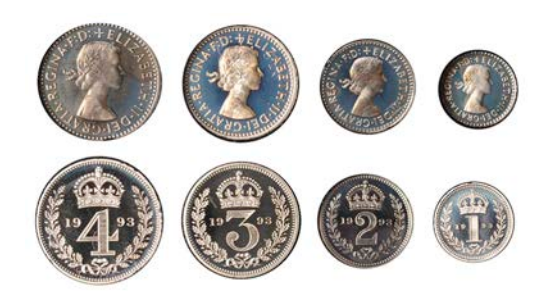
338 Maundy set, 1993 (S 4211) [4]. Virtually as struck; in perspex slide-case, within official 3-inch Royal Mint case; sold with programme £240-£280