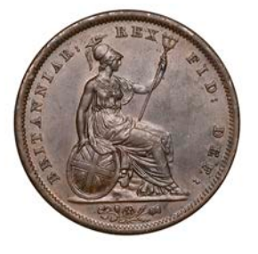
265 Penny, 1826, rev. A (BMC 1422; S 3823). A few minor marks, otherwise extremely fine