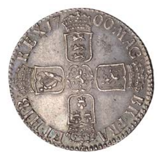
188 Shilling, 1700, fifth bust, tall 0's in date (ESC 1150; S 3516). Sometime lightly cleaned, now with pleasing tone with a superb bust, about extremely fine £200-£260