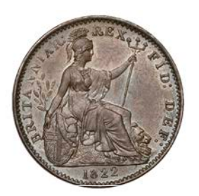
266 Proof Farthing, 1822, obv. 1, 4.75g/6h (Cooke 263; BMC 1410; S 3822). Extremely fine, extremely rare