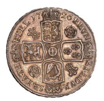
196 Crown, 1726, roses and plumes, edge DECIMO TERTIO, all N's inverted on edge (ESC 1548; S 3639A). Toned with some underlying lustre, good very fine and rare