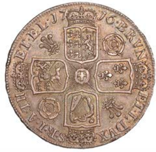
194 Crown, 1716, roses and plumes, edge SECVNDO (ESC 1540; S 3639). Attractive cabinet tone with underlying lustre, good very fine £1,200-£1,500