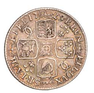
198 Shilling, 1725 wcc, second bust, harp with 6 strings (ESC 1596; S 3650). Nearly very fine and very rare