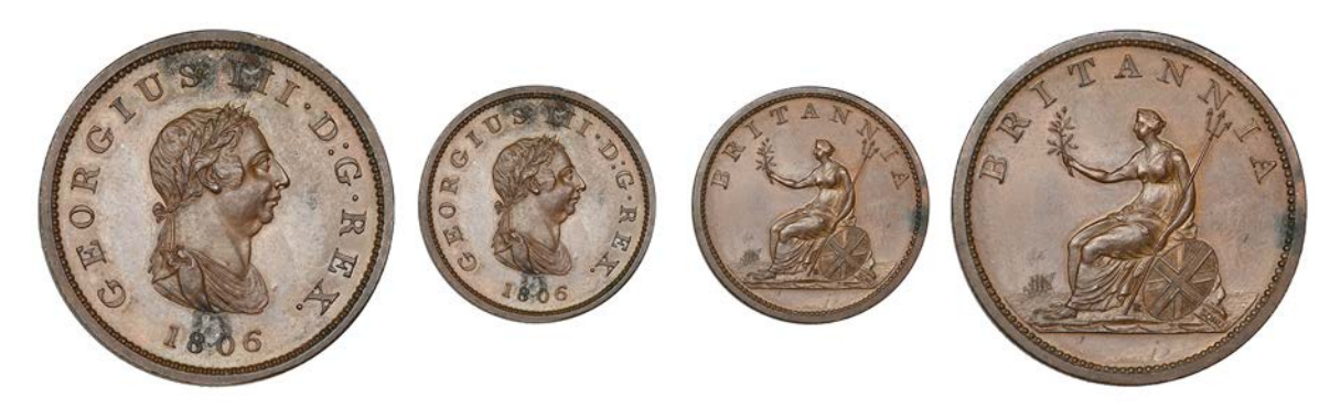
227 Halfpenny, 1806 (late Soho), proof in bronzed-copper, by C.H. Küchler, laureate bust right, κ on shoulder, brooch with third and sixth jewels broken off, faint line flaw extending right from base of 6 in date, rev. Britannia seated left, olive branch with 10 leaves and 2 berries, no line under soho, edge centre-grained, 9.51g/12h (BMC 1361 [KH 35]; Selig 1402; S 3781). Light surface stains, extremely fine or better