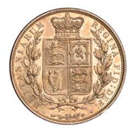
298 Halfcrown, 1881 (ESC 2758; S 3889). Surfaces prooflike but with some marks and hairlines, extremely fine or better