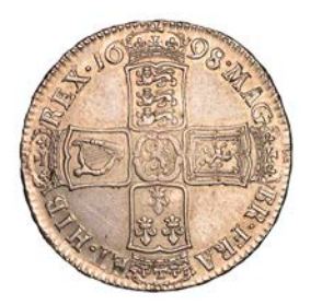
186 Halfcrown, 1698, edge DECIMO (ESC 1034; S 3494). Of bright appearance, otherwise nearly extremely fine