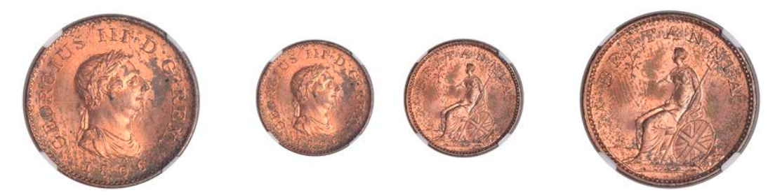
228 Farthing, 1806 (BMC 1397; S 3782). About mint state with some patchy original colour [certified and graded by NGC as MS 63 RB] £150-£180