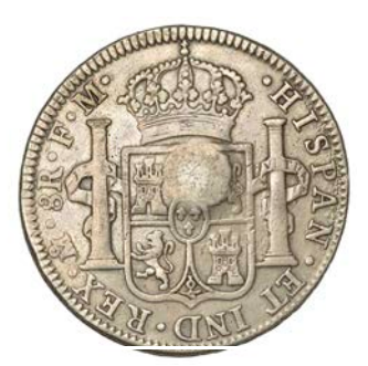
Mexico , Charles IV , 8 Reales, 1794<sub>FM</sub>, Mexico City, obv. countermarked with head of George III in oval, 26.73g/11h (ESC 1852; S 3765A). Fine, countermark better £100-£120