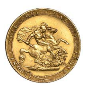
G 247 Sovereign, 1820, closed 2 in date (M 4B; S 3785C). Has been lightly cleaned, better than very fine