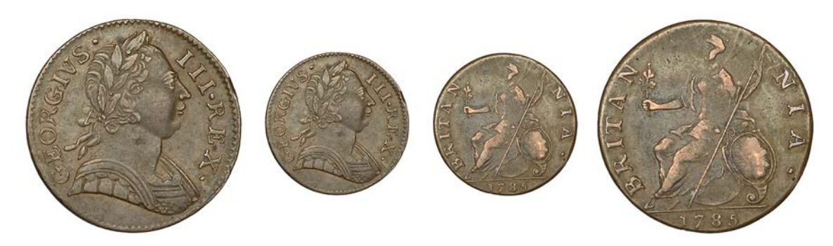
225 Halfpenny, 1785 (Newman 51-85C; cf. S 3774) [2]. A contemporary imitation, about very fine, rare and sought after £150-£200