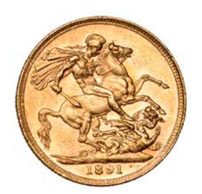
G 285 Sovereign, 1891, horse with long tail (M 142; S 3966C). Minor bagmarking, otherwise extremely fine, scarce