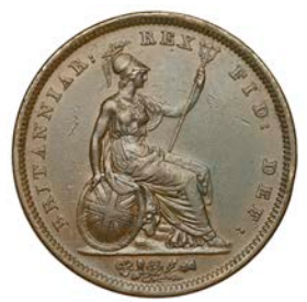
264 Penny, 1825 (BMC 1420; S 3823). Good very fine with brown patina