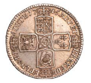
205 Halfcrown, 1745 LIMA, edge DECIMO NONO (ESC 1687; S 3695). Very fine