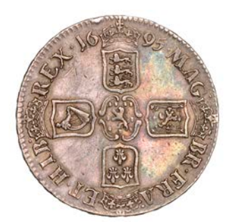
182 Crown, 1695, first bust, edge OCTAVO (ESC 991; S 3470). Surface scratches, very fine