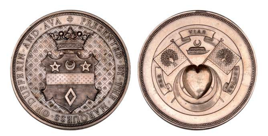
Dufferin's Pattern Viceroy Presentation medal , c. 1884, a silver award medal by A. Wyon for Pinches, coronet over shield of arms of Blackwood, rev. modified arms of Blackwood, heart in crescent moon within garter, flags left and right (including Burma), 51mm, 76.65g (Pudd. 884.1.1; cf. MJP p.37; cf. DNW 58, 1441). Extremely fine and very rare £400-£500