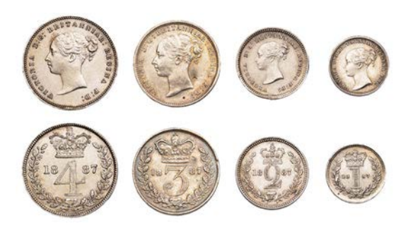
307 Maundy set, 1887 (ESC 3544; S 3916) [4]. Extremely fine; in dated case of issue