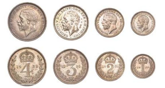
327 Maundy set, 1933 (ESC 3994; S 4043) [4]. Extremely fine; in red leather case