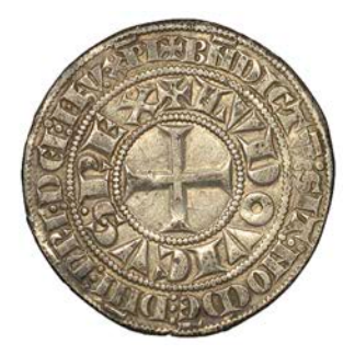
513 ROYAL, Louis IX (1226-70), Gros tournois, cross, rev. chatel, 3.82g/10h (Dup. 190). About very fine