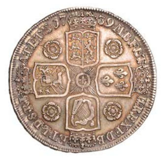
204 Crown, 1739, roses, edge DVODECIMO (ESC 1665; S 3687). Two old light scratches on cheek, very fine, reverse better