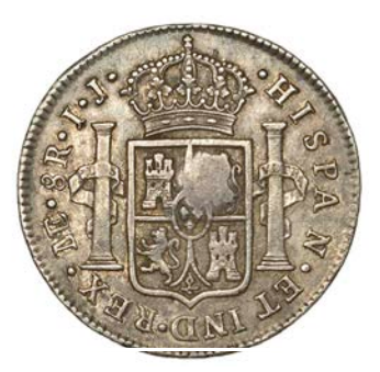
230 Peru , Charles IV , 8 Reales, 1790<sub>I</sub>, Lima, obv. countermarked with head of George III in oval, 26.86g/12h (ESC 1858; S 3765A). Very fine, countermark better