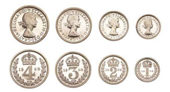
334 Maundy set, 1958 (ESC 4568; S 4131) [4]. About as struck, in Royal Mint case, with programme