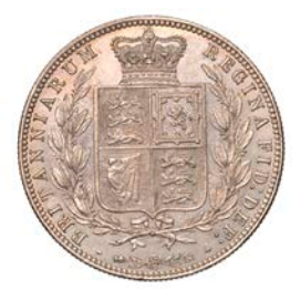
297 Halfcrown, 1875 (ESC 2745; S 3889). Virtually mint state, the reverse fields lightly prooflike