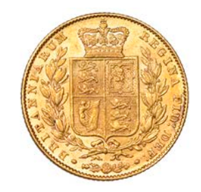
G 274 Sovereign, 1846 (M 29; S 3852). Some contact marks, otherwise very fine