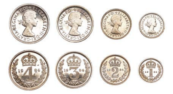
337 Maundy set, 1984 (S 4211) [4]. Some metal flaws on Fourpence, otherwise about as struck