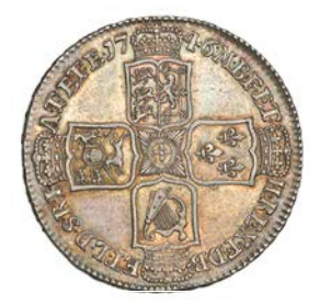
206 Halfcrown, 1746 LIMA, edge DECIMO NONO (ESC 1688; S 3695A). Dark cabinet tone, better than very fine