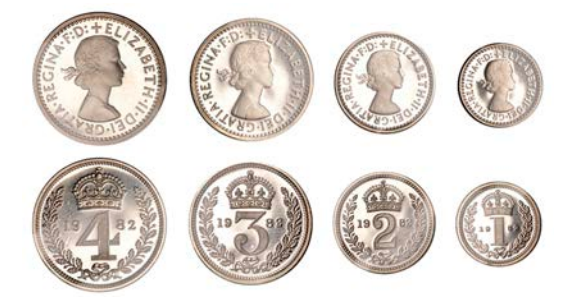
336 Maundy set, 1982 (S 4211) [4]. About as struck; cased