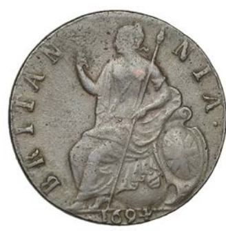
179 Halfpenny, 1694 (BMC 602; S 3452). About very fine