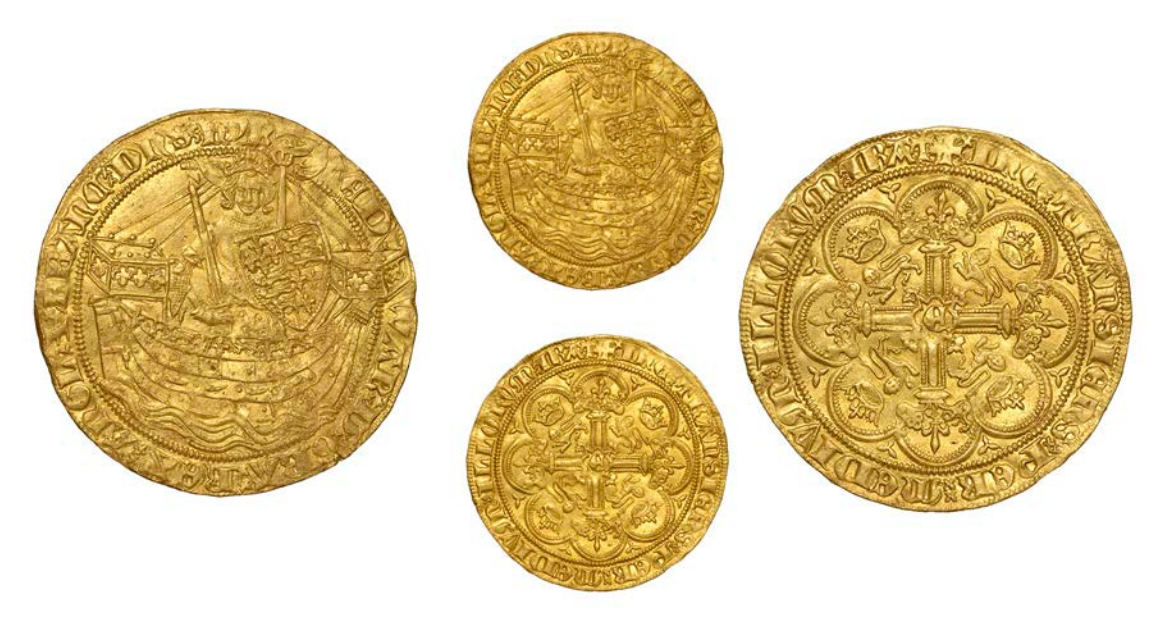
A Great Gold Rarity

70 Third Coinage, Third Period, Noble [of 128.6 grains], London, ED/WAR:D:GRA:REX:ANGL:Z:FRANC:DNS:HYB:, king in ship with sword and shield, rev. +: IHC:TRANSIENS:PER:MEDIVM:ILLORV:IBAT:, royal cross in tressure, E at centre, 8.27g/11h (SCBI Schneider 3; Potter la1; Lockett —; N 1110; S 1481). A field-find with light scuffing and traces of residual lustre, otherwise full, round and good very fine, being struck from early dies of excellent style; extremely rare thus £8,000-£12,000