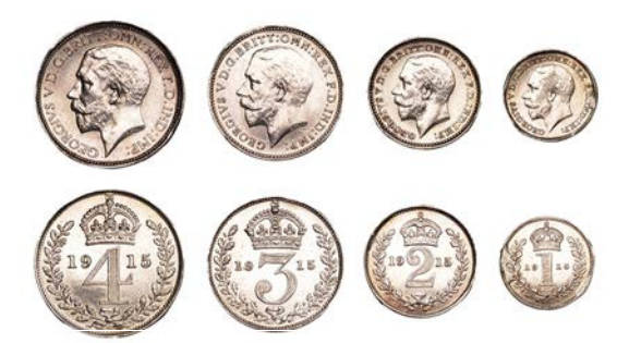
326 Maundy set, 1915 (ESC 3975; S 4016) [4]. Has been lightly cleaned at some time, otherwise extremely fine; in dated case of issue £150-£180

325 Florin, 1932 (ESC 3789; S 4038). Light scuff on neck, some surface verdigris on obverse, extremely fine, reverse better, rare £200-£300