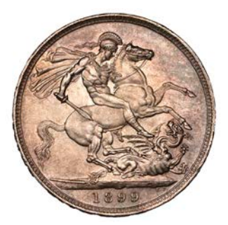
294 Crown, 1899, edge LXIII (ESC 2607; S 3937). Attractively toned subduing a near full mint bloom, some light bagmarks, otherwise good extremely fine [Graded NGC MS 62]