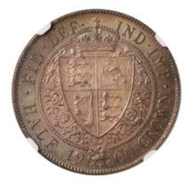
301 Halfcrown, 1900 (ESC 2786; S 3938). About mint state and attractively toned [slabbed MS 62]