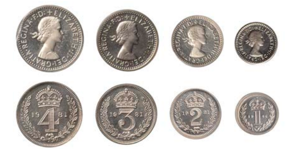
335 Maundy set, 1981 (ESC 2598; S 4211) [4]. Mint-sealed; in original maroon Royal Mint case of issue, with programme and red leather pouch