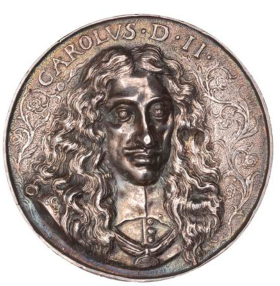
Charles II, Coronation , a hollow silver cast medal, unsigned [by P.H. Van Gelder], CAROLVS . D . I ., bust of Charles I three-quarters left, long hair falling over lace collar, rev. CAROLVS . D . II ., bust of Charles II almost full facing, long hair falling over shoulders, wearing medal on broad riband, field both sides decorated with tracery of flowers, 50.37g, 69mm (MI 449/33; E 209 note). Air hole in edge at 12 o'clock, good very fine and very rare