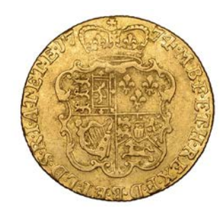
214 Guinea, 1774, fourth bust (EGC 687; S 3728). Two scratches to left of king's head, otherwise fine