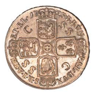
195 Crown, 1723 ss c, edge DECIMO (ESC 1545; S 3640). About extremely fine