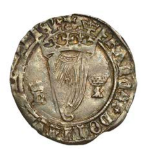
463 First Harp issue (1534-40), Groat, mm. crown, HI (Jane Seymour), 2.30g/4h (S 6473; DF 202). Slightly small of flan, very fine or better, toned