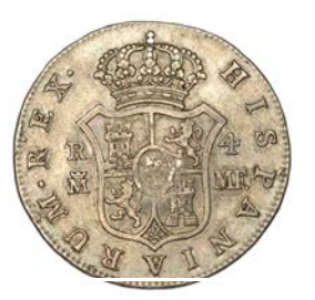
SPAIN , Charles IV , 4 Reales, 1792MF, Madrid, obv. countermarked with head of George III in oval, 13.63g/12h (ESC 1875; S 3767). Countermark struck at angle, good very fine, host coin very fine £200-£300