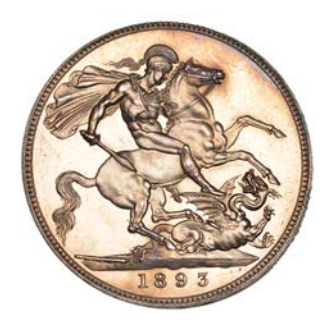
292 Proof Crown, 1893, edge LVI (ESC 2594; S 3937). Light marks and scratches before face, otherwise virtually mint state with mirrored fields, the portrait frosted, rare £1,500-£2,000