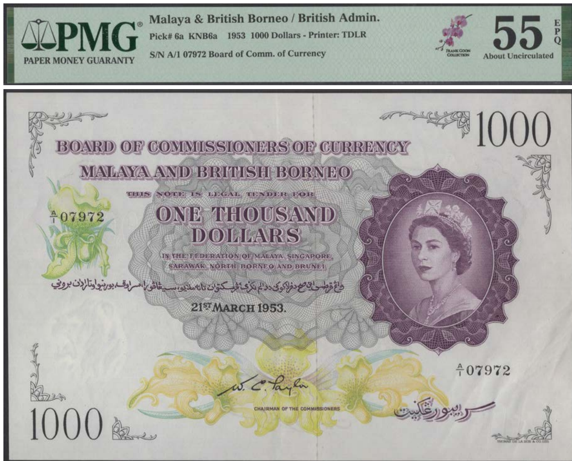
BOARD OF COMMISSIONERS OF CURRENCY MALAYA AND BRITISH BORNEO $1000, 21 MARCH 1953, SERIAL NUMBER A/1 07972