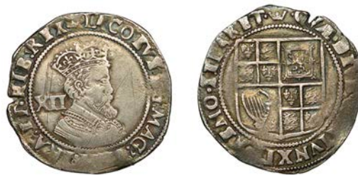
149 Second coinage, Shilling, mm. coronet, fifth bust, 5.74g/3h (N 2101; S 2656). Light scratches in fields, good fine, clear portrait £120-£150