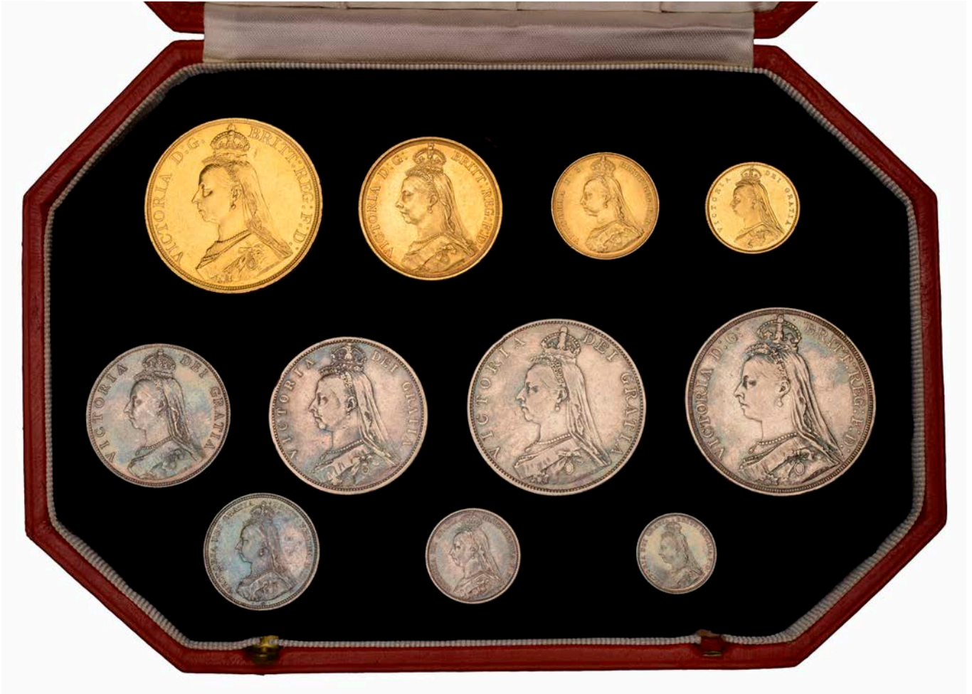
226 Specimen set, 1887, comprising Five and Two Pounds, Sovereign and Proof Half-Sovereign, Crown to Threepence [11]. The gold good very fine or better, the Half-Sovereign possibly an impaired proof, the silver very fine or better; housed in fitted case £3,000-£4,000