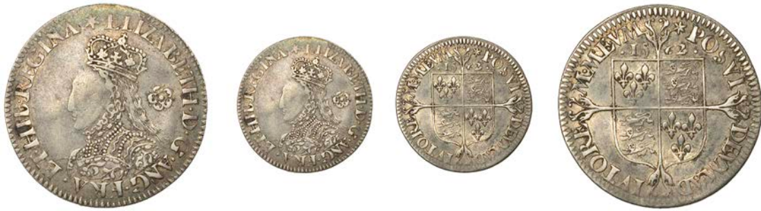
147 Milled coinage, Sixpence, 1562, mm. star, bust D, 3.08g/7h (Borden/Brown 26, O7/R4; N 2027; S 2596). Nearly very fine but smoothed on face £150-£200