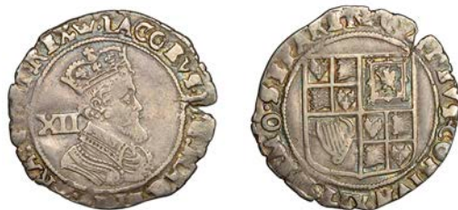
150 Second coinage, Shilling, mm. coronet, fifth bust, 5.74g/3h (N 2101; S 2656). Good fine, even grey tone £120-£150