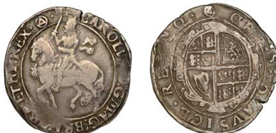
151 Tower mint, Halfcrown, Gp IV, type 4, mm. triangle-in-circle, 14.54g/7h (SCBI Brooker 371-4; N 2214; S 2779). Fine £90-£120