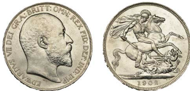
228 Crown, 1902, edge II (ESC 3560; S 3979). Lightly cleaned, extremely fine