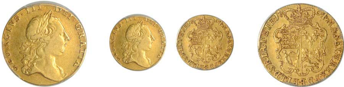
1246 Guinea, 1764, second bust, stop over head (EGC 674; S 3726). Good fine, some toning, scarce [slabbed PCGS VF 30] £1,500-£1,800