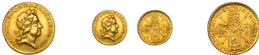
1230 Quarter-Guinea, 1718 (EGC 550; S 3638). Lightly toned, extremely fine [Graded by NGC as MS 61] £240-£300 Provenance: G. Lawrence Collection