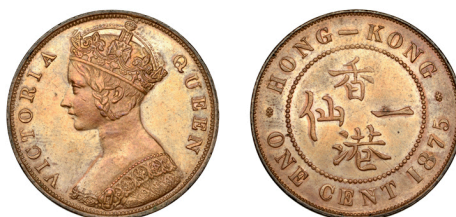
1443 Victoria, Cent, 1875 (Prid. 168; KM 4.1). Very lightly cleaned, otherwise extremely fine