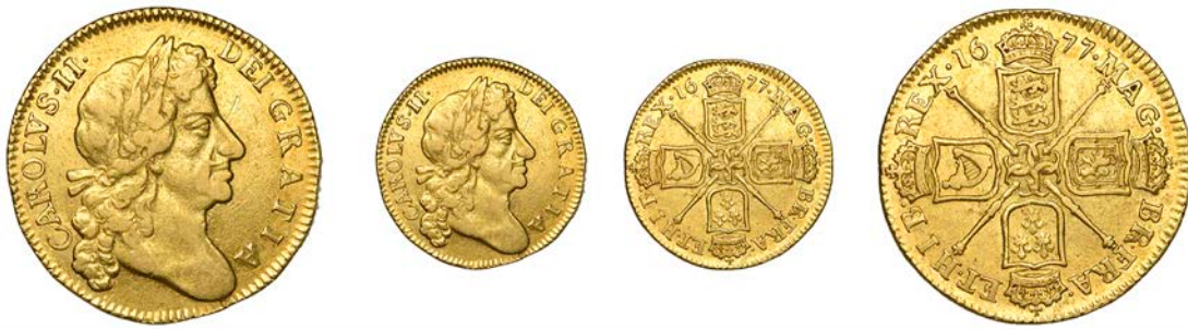
1206 Guinea, 1677, fourth bust (MCE 76; S 3344). Small dig to right of king's nose, otherwise good fine, rare