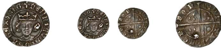
1121 Penny, London, mm. short cross fitchée on obv. only, reads HENRICVS DI GRA REX ANG, 0.77g/2h (N 1622; S 2087). Pierced in field, otherwise better than very fine with an impressive portrait, rare £240-£300

Provenance: Archbishop Sharp Collection, Morton & Eden, Auction 91, 7 December 2017, lot 136