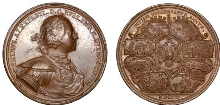
1566 Military Successes of Russia, 1710 , a bronze Medal by T. Ivanov, laureate, draped and armoured bust right, rev. coat of arms at centre, surrounded by 8 shields depicting military victories that year, 47mm, 42.25g (Diakov 39.6). Toned with underlying reflectivity, good extremely fine [Graded by NGC as 63 BN] £120-£150