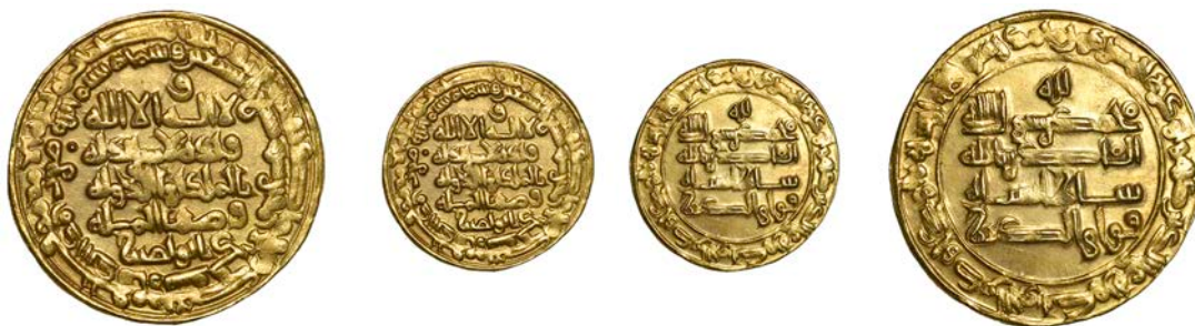
1524 Baha' al-dawla , Dinar, Suq al-Ahwaz 399h, 3.91g/9h (A 1573). Good very fine