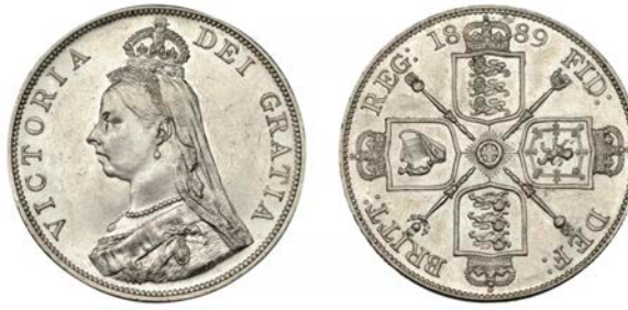
1323 Double Florin, 1889 (ESC 2701; S 3923). Some light bagmarks, extremely fine