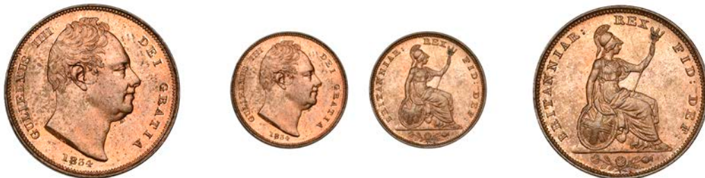
1307 Farthing, 1834, rev. B (BMC 1471; S 3848). Lightly toned with much original colour and lustre, mint state