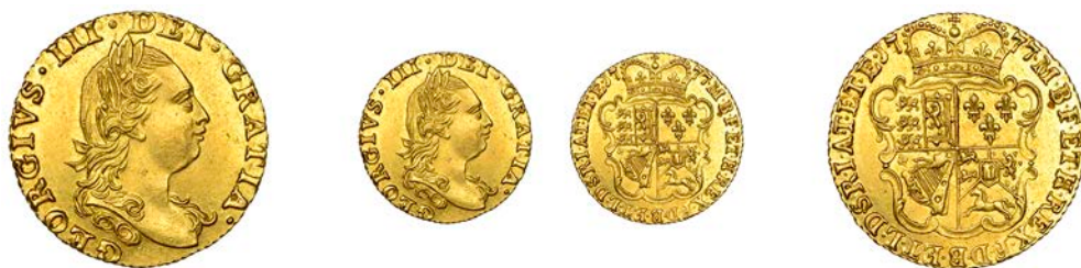
1251 Half-Guinea, 1777, fourth bust (EGC 819; S 3734). Lustrous, good very fine £240-£300 Provenance: G. Lawrence Collection