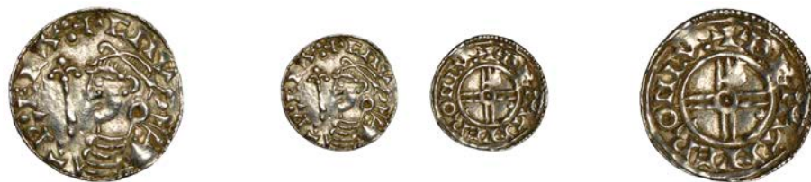
1068 Penny, Short Cross type, London , Beorhtmær, BRIHTMÆR ON LV: 1.12g/3h (BEH 2038 var. [copulative] SCBI Norwegian 3459, same rev. die; N 790; S 1159). A little crimped, otherwise better than very fine £200-£260