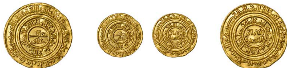
1516 al-Amir , Dinar, al-Iskandariya, 511h, 3.91g/4h (Nicol 2456; A 729). About extremely fine

Provenance: Baldwin Auction 94, 6 May 2015, lot 1662