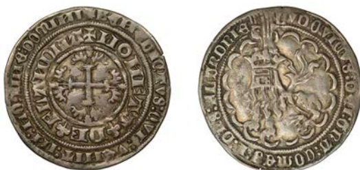
1486 FLANDERS, Louis de Male (1346-84), Double Gros or Botdraeger, helmeted lion sejant, rev. ornate cross within double inscription, 3.62g/3h (Gaillard 223; Boudeau 2232). Very fine £120-£150