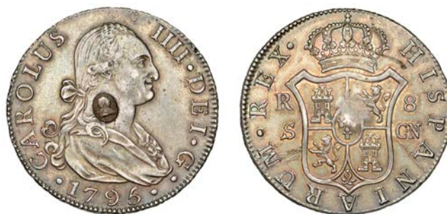
1271 SPAIN, Charles IV , 8 Reales, 1795 CN , Seville, obv. countermarked with head of George III in oval, 27.07g/12h (ESC 1851; S 3766). Patches of scratching in reverse fields, otherwise with an attractive orange hue, about extremely fine, rare thus £400-£500 Provenance: Glendining Auction, 24 January 1996, Lot 248