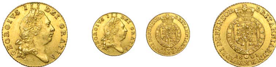
G 1253 Half-Guinea, 1801, sixth bust (MCE 439; S 3736). Very fine