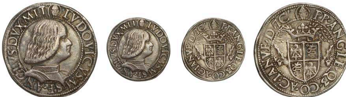
1475 MILAN, Ludovico Maria Sforza 'il Moro' (1494-1500), Testone, armoured bust right, rev. crowned arms, 9.61g/6h (MIR 229/2; CNI 20). Better than very fine, toned £300-£400