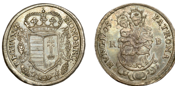
1454 Franz II Rákóczi , Revolutionary Coinage, Half-Thaler, 1705KB, Kremnica (KM 265). Toned, good very fine or better £400-£600