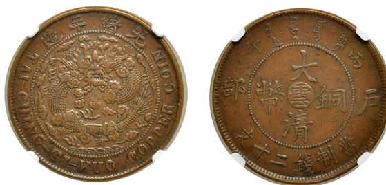
1421 Yunnan, Guangxu, 20 Cash, yr 43 [1906], mm. Yun, Yunnan (KM Y.11). Toned with an even brown patina, good very fine and very rare [Graded by NGC as AU 55 BN] £600-£800