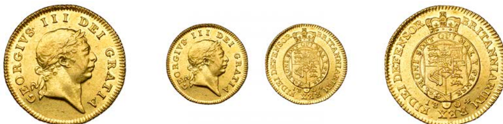
G 1254 Half-Guinea, 1804, seventh bust (EGC 849; S 3737). Some contact marks in fields, otherwise lustrous, about extremely fine £400-£500