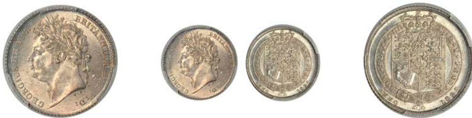
1302 Sixpence, 1825 (ESC 2427; S 3814). Lustrous, mint state [Graded by PCGS as MS 64] £240-£300