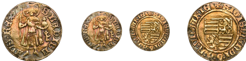
1446 Sigismund , Forint or Goldgulden, c. 1411, mm. spade, without pellets, Kremnitz, 3.59g/9h (cf. Lengyel 18/3; ÉH 446; Huszár 573). Heavily toned and possibly mounted, otherwise very fine £300-£400