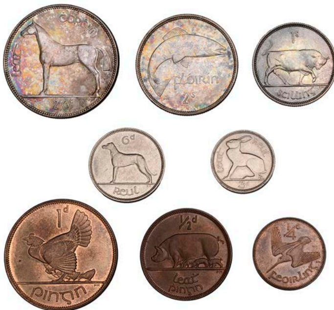
1375 Proof set, 1928, comprising Halfcrown to Farthing [8]. About as struck, but the Halfcrown wiped; in official green leatherette case of issue £400-£500