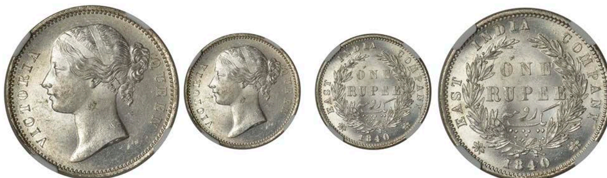
1468 EIC, Victoria, Rupee, 1840, type II, Calcutta or Bombay (SW 3.33; Prid. 56). Lustrous, extremely fine [Graded by NGC as MS 64]