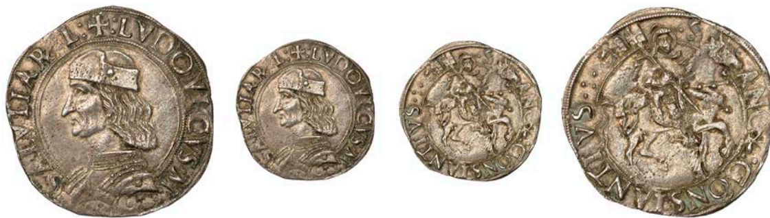
1473 CARMAGNOLA, Ludovico II di Saluzzo (1475-1504), Cavallotto, bust left wearing biretta, rev., St Constantine on horseback right, 3.81g/3h (MIR 126; CNI 35). Good very fine £400-£500