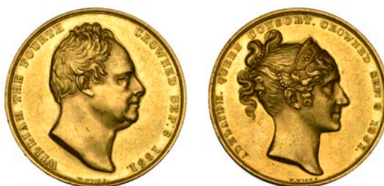
1551 Coronation of William IV and Queen Adelaide, 1831 , a gold medal by W. Wyon, bust right, rev. bust of Queen Adelaide right, 33mm, 27.77g (BHM 1475; E 1251). Fields scuffed, otherwise very fine, rare £2,400-£3,000