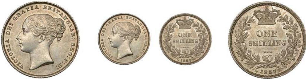
1329 Shilling, 1857 (ESC 3008; S 3904). Extremely fine