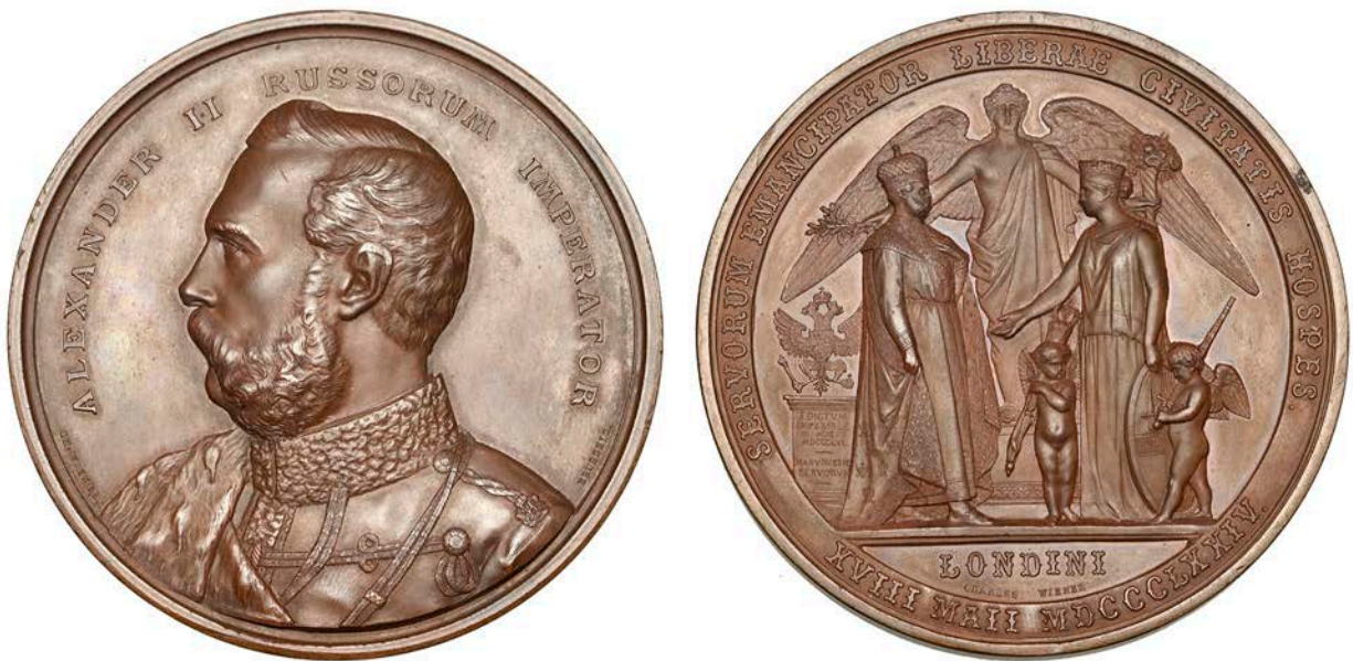
1558 Visit of Czar Alexander II to London, 1874, a bronze medal by C. Wiener for the Corporation of the City of London, uniformed bust left, rev. Alexander and Londinia standing, winged Peace behind, 77mm (Diakov 807.1; W & E 1225A.1; BHM 2981; E 1634). Extremely fine; in maroon gilt-blocked case of issue stamped Charles Wiener, Medallist, Brussels £500-£700