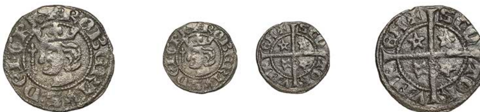
1385 Sterling, colon stops, four mullets of six points in angles, 1.30g/10h (SCBI 35, 318-20; B 1, fig. 225; S 5076). Better than fine, surfaces dark and coarse from fire damage (?) £300-£360