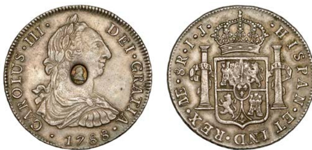
1267 PERU, Charles III , 8 Reales, 1788 J , Lima, obv. countermarked with head of George III in oval, 26.84g (ESC –; S 3765A). Good very fine, lightly toned £700-£900