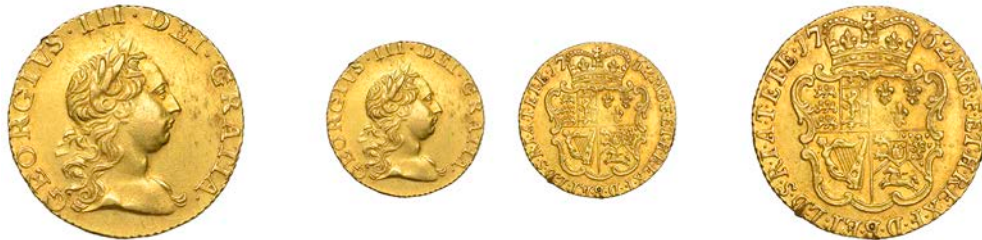
1250 Half-Guinea, 1762, first bust (MCE 405; S 3731). Lightly cleaned, very fine and very rare £1,200-£1,500 Provenance: G. Lawrence Collection