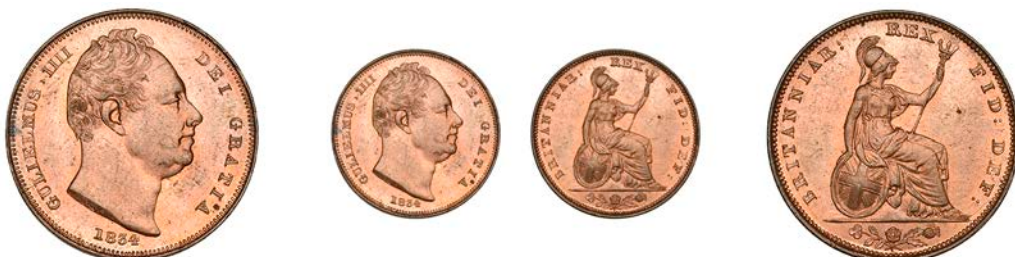
1308 Farthing, 1834, rev. B (BMC 1471; S 3848). About as struck with full original colour and lustre