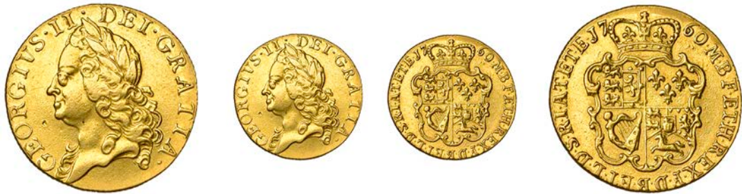
1240 Guinea, 1760 (EGC 624; S 3680). Possibly once mounted in jewellery, otherwise very fine or better