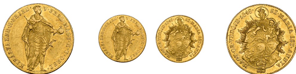
1455 Ferdinand V , War of Independence Coinage, Ducat, 1848KB, Kremnica (KM 433). Lustrous, about extremely fine £400-£500