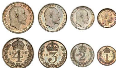
1357 Maundy Set, 1905 (ESC 3611; S 3985) [4]. About mint state with matching tone; in dated case of issue