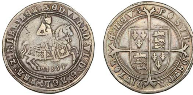
1130 Third Period, Crown, 1551, mm. y, reads FRA' z ; HIBE, 30.09g/12h (Lingford dies F-4; N 1933; S 2478). Fine, toned, rare £800-£1,200