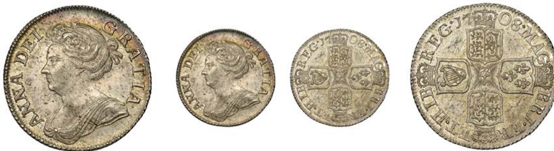
1223 Shilling, 1708, third bust, plain (ESC 1399; S 3610). Lightly toned with subdued lustre, some flecking, extremely fine [Graded by NGC as MS62] £200-£260