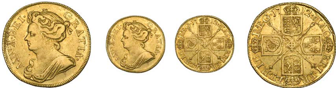
1220 Guinea, 1712, third bust (MCE 224; Bull 476; S 3574). Fine