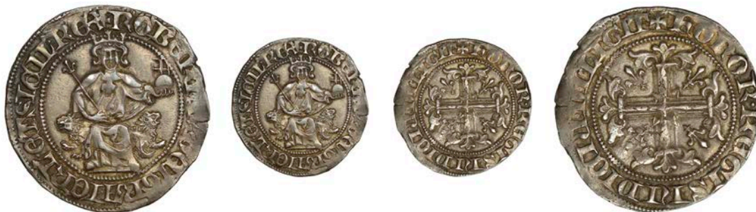
1477 NAPLES, Robert of Anjou (1309-43), Gigliato, king seated holding orb and sceptre, rev. ornate cross, 3.96g/12h (Biaggi 1634). Better than very fine and toned £80-£100