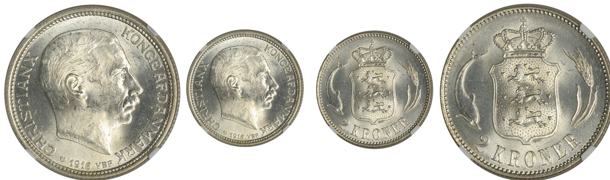
1423 Christian X, 2 Kroner, 1916 VBP , Copenhagen (Hede 8; KM 820). Lustrous, mint state [Graded by NGC as MS 64] £120-£150