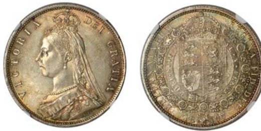
1325 Halfcrown, 1887 (ESC 2771; S 3924). Attractive cabinet tone, good extremely fine [Graded by NGC as MS 64]