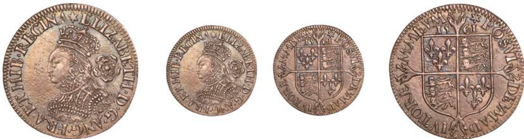
1136 Milled coinage, Sixpence, 1561, mm. star, bust A, decorated dress, large rose, 2.73g/6h (Borden/Brown 21, O1/R2; N 2024; S 2593). Nearly extremely fine and toned £500-£600

Provenance: Davissons Mailbid Sale 38, February 2019 (110); Covent Garden Collection