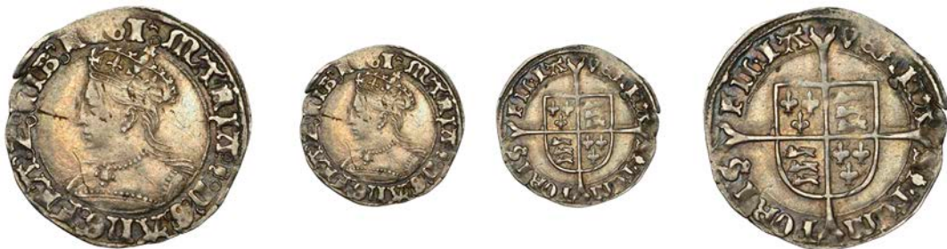
1132 Groat, mm. pomegranate, 2.07g/12h (N 1960; S 2492). A few flan flaws, otherwise very fine, some iridescence £200-£260