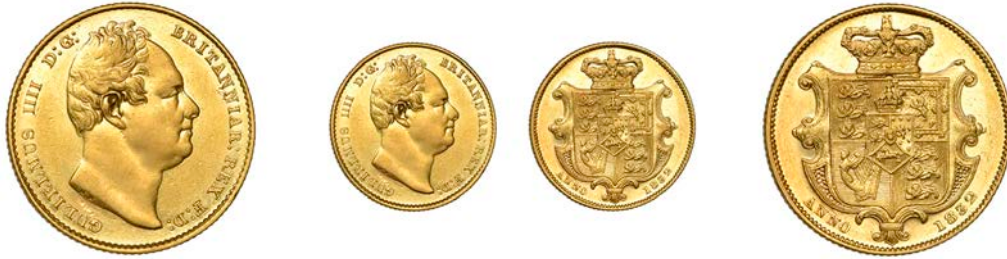
G 1305 Sovereign, 1832, second bust (Hill 17; S 3829B). Smoothing on king's bust, otherwise good very fine