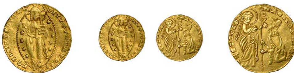
1480 VENICE, Andrea Dandolo (1343-54), Ducato, 3.36g/12h (Paolucci 1; F 1221). Perhaps removed from a ring mount, slightly creased, about very fine £180-£220

Provenance: R. Erskine Collection [bt Coins & Antiquities 1977]