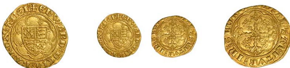
1099 Treaty period, Quarter-Noble, London, nothing before EDWARD, unbarred A in GRA, curule x and double saltire stops both sides, 1.92g/5h (SCBI Schneider 83-4; N 1243; S 1510). On a slightly irregular flan, otherwise very fine or better £500-£700

Provenance: Found Norfolk September 1997