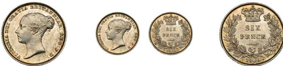
1336 Sixpence, 1842 (ESC 3175; S 3908). Extremely fine and scarce thus