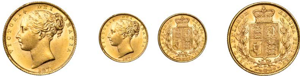
G 1314 Sovereign, 1871, die 28 (Hill 55; S 3853B). Highly lustrous, good extremely fine [Graded by NGC as MS 63] Provenance: G. Lawrence Collection