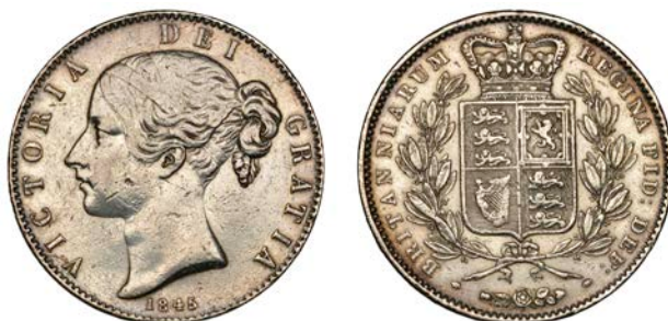
1317 Crown, 1845, edge VIII, cinquefoil stops (ESC 2564; S 3882). A few surface and rim marks, good fine but sometime cleaned £200-£260