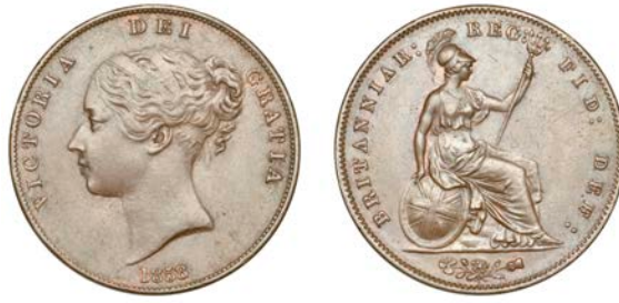
1345 Penny, 1858/3 (Gouby G; BMC 1515; S 3948). Toned with some traces of original colour, about extremely fine, rare £120-£150