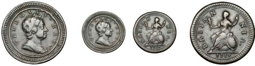
1232 Farthing, 1719, legend continuous over bust (BMC 1815; S 3662 var.). Good fine, the variety rare