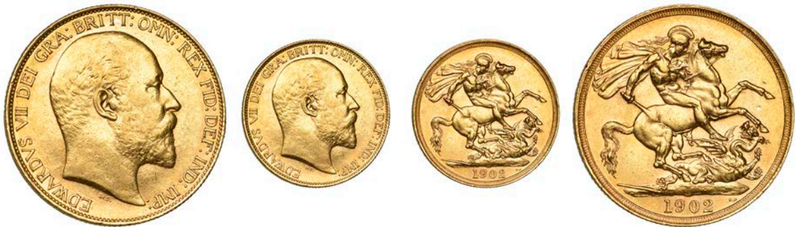
G 1355 Two Pounds, 1902 (Hill T40; S 3967). Good very fine Provenance: G. Lawrence Collection