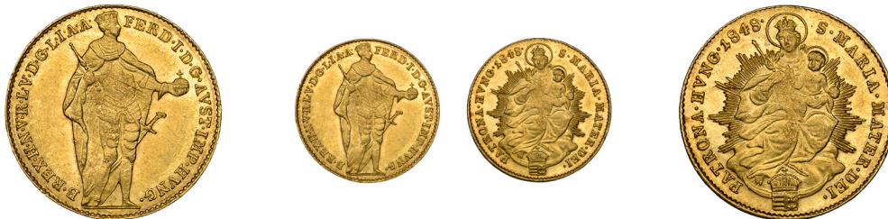
1456 Ferdinand V, Ducat, 1848, Kremnica (KM 425). Lightly toned with reflective fields, extremely fine