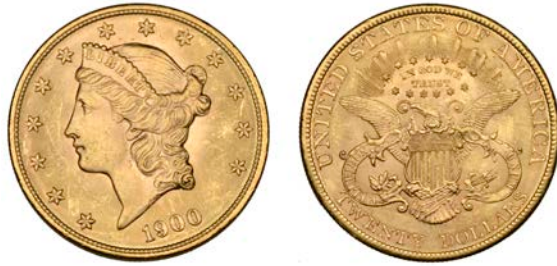
1494 Twenty Dollars, 1900, Liberty head (KM 74.3). Lustrous, mint state