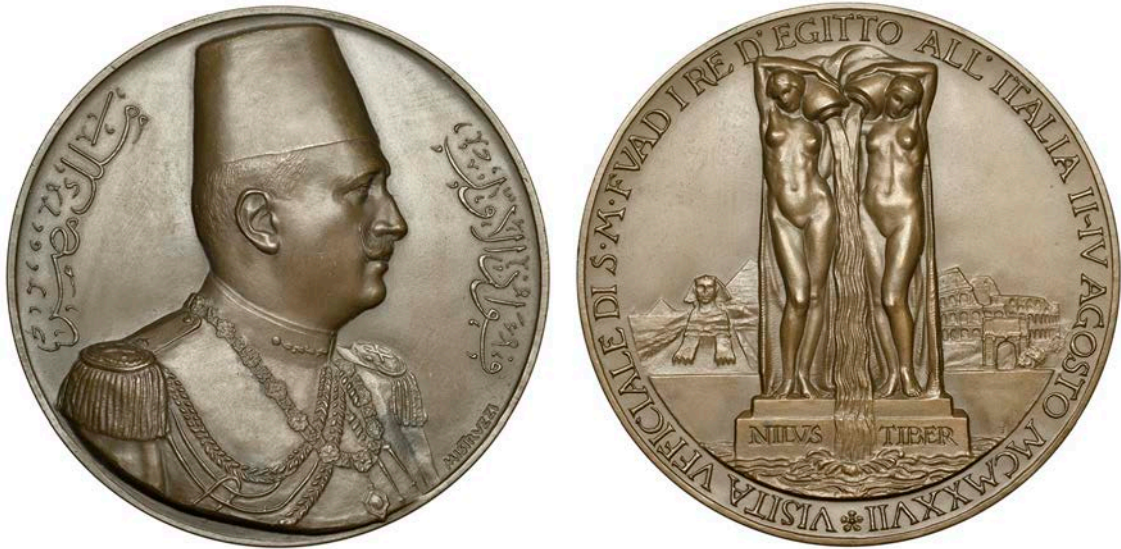
1591 EGYPT, Faud I, Official Visit to Rome, 1927 , a large bronze medal by Aurelio Mistruzzi, capped and uniformed bust right, rev. river goddesses of the Nile and Tiber standing together upturning urns of water, Egyptian and Italian landmarks in background, 72mm, 187.74g (Casolari VI/98). A superb example, practically as struck, very rare £600-£800