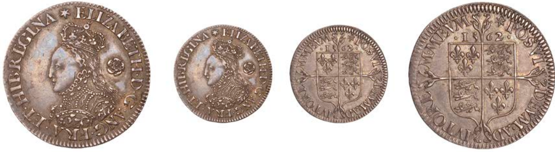
1142 Milled coinage, Sixpence, 1562, mm. star, bust D, broader bust, decorated dress, small rose, 3.08g/7h (Borden/Brown 25, O6/R3; N 2027; S 2596). Extremely fine or better, reflective fields, dark-toned £1,000-£1,200

Provenance: W. Wilkinson Collection, DNW Auction 148, 18-20 September 2018, lot 504 [from C.J. Martin February 1994]; Covent Garden Collection