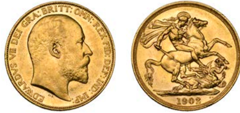
G 1354 Two Pounds, 1902 (Hill T40; S 3967). About extremely fine, reverse a little better Provenance: A. Mint Collection