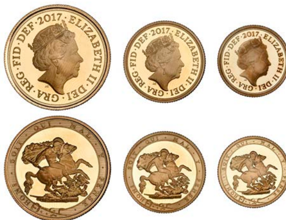
G 1364 Proof set, 2017, comprising gold Sovereign, Half-Sovereign and Quarter-Sovereign, rev. St George within Garter [3]. Brilliant, as struck; in case of issue with certificate no. 055 of 997 sets issued