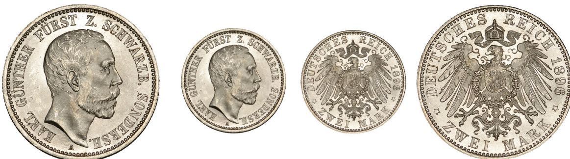
1438 SCHWARZBURG-SONDERHAUSEN, Karl Günther, 2 Marks, 1896A, Berlin (Jaeger 168; KM 150). Lustrous with full mint bloom, some light scuffs on obverse, otherwise mint state, rare [Graded by NGC as MS 64] £200-£300