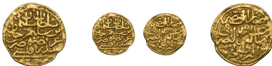
1521 Murad III, Sultani, Sidreqapsi, date unclear (982h?), 3.50g/11h (Pere 278; Album 1332.1). Good fine