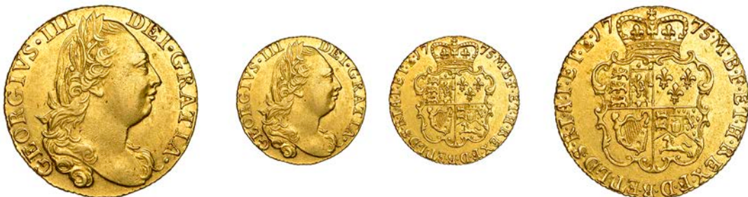
1247 Guinea, 1775, fourth bust (EGC 691; S 3728). Very fine, wiped