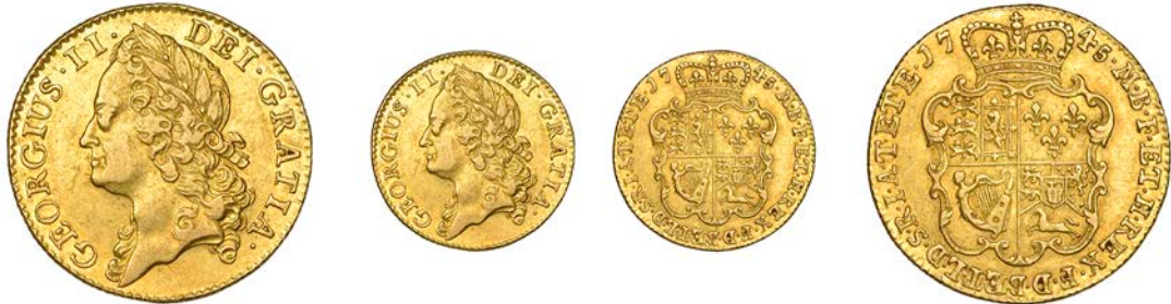
1239 Guinea, 1745 (MCE 319; S 3678). Lightly toned, very fine, rare