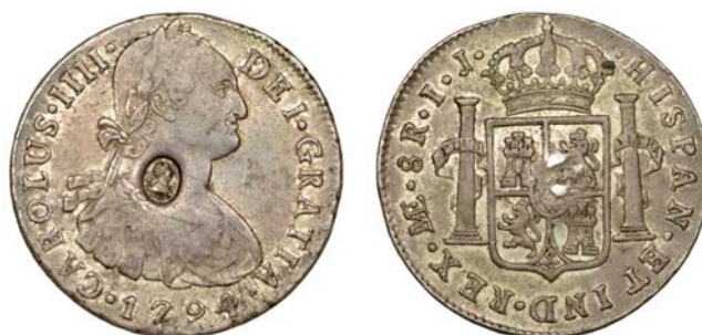
1270 PERU, Charles IV , 8 Reales, 1794 J , Lima, obv. countermarked with head of George III in oval, 26.34g/12h (ESC 1858; S 3765A). Uneven toning, very fine or better £200-£300

Provenance: The Swiss Bank Corporation, Auction 69, 23 January 2007, Lot 2759