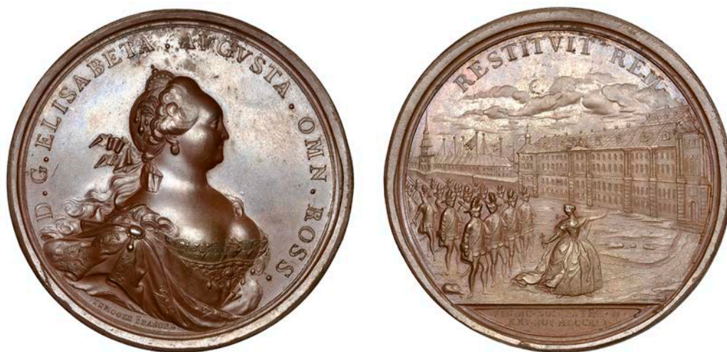
1573 Accession to the Throne of Elizabeth, 1741 , a bronze Medal by T. Ivanov, crowned and draped bust right, rev. Empress, holding a cross, leading troops into the Twelve Collegia Building, 65mm, 105.89g (Diakov 84.2). Lightly toned, practically as struck [Graded by NGC as MS 63 BN] £150-£200