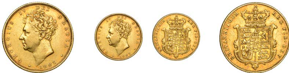
G 1297 Sovereign, 1825, type 2 (Hill 10; S 3801). Good fine, toned