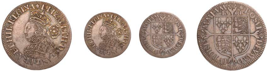
1135 Milled coinage, Sixpence, 1561, mm. star, bust A, decorated dress, large rose, 2.92g/6h (Borden/Brown 21, O2/R2; N 2024; S 2593). Minor field marks, good very fine £400-£500