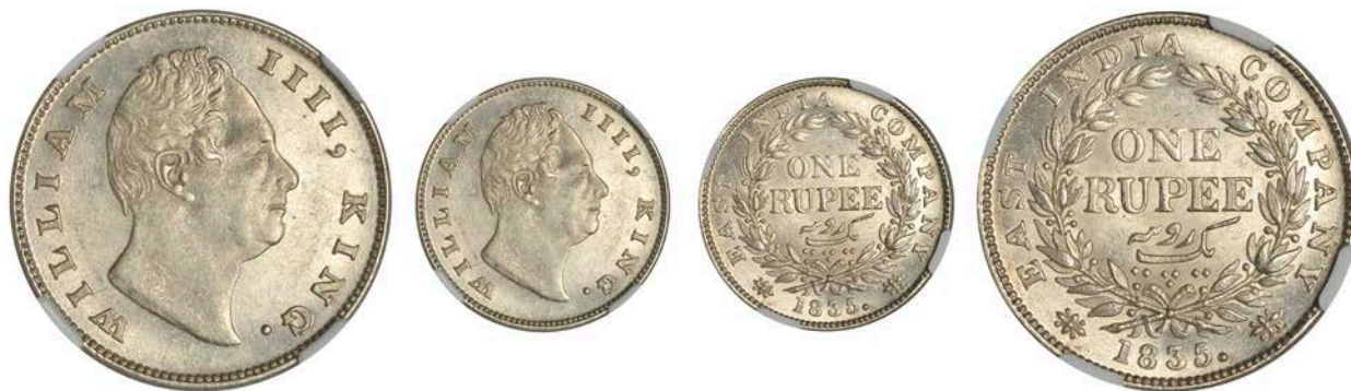
1465 EIC, William IV, Rupee, 1835, type C/2, Calcutta (SW 1.39; Prid. 34). Lustrous, extremely fine [Graded by NGC as MS 62]