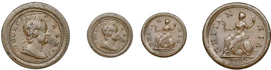
1233 Farthing, 1722, small lettering on obv. (BMC 825; S 3662). Traces of undertype visible on obverse, very fine, brown patina, interesting