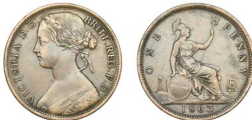
1348 Penny, 1863, dies Jg, open 3 in date (Gouby B; F -; Bamford 62; S 3954). Toned, very fine and extremely rare £300-£400