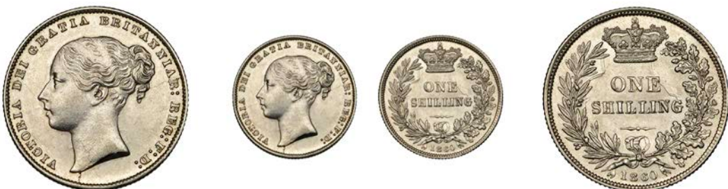
1332 Shilling, 1860 (ESC 3018; S 3904). Better than extremely fine, scarce