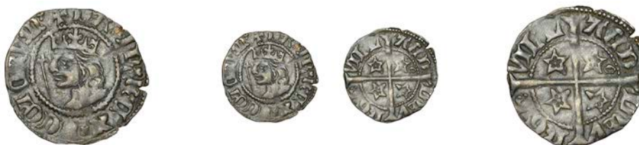
1386 Second coinage, Sterling, class B, Edinburgh, mm. cross potent on obv. only, larger young bust with smaller shoulder, saltire after DAVID, REX, and SCOTORVM, rev. VILL AED INBV RGH, long cross, four large mullets of five points in angles, small reversed D under AED, ornate AS both sides, 0.88g/3h (SCBI 35, 410; B 6, fig. –; S 5115). Very fine, clear portrait, dark patina; rare thus £200-£260