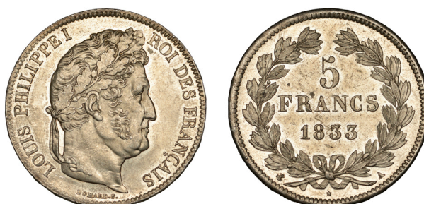
1426 Louis Philippe, 5 Francs, 1833A, mm. star and anchor, Paris (KM 749.1). Some light hairlines, otherwise lustrous, extremely fine [Graded by NGC as MS 62] £150-£200

Provenance: R. Erskine Collection [bt Spink 1978]