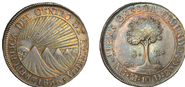
1419 8 reales, 1835 NG , Nueva Guatemala, 29.96/6h (KM. 4). Almost extremely fine and attractively toned, scarce in this state [Graded by NGC as AU 58] £200-£300