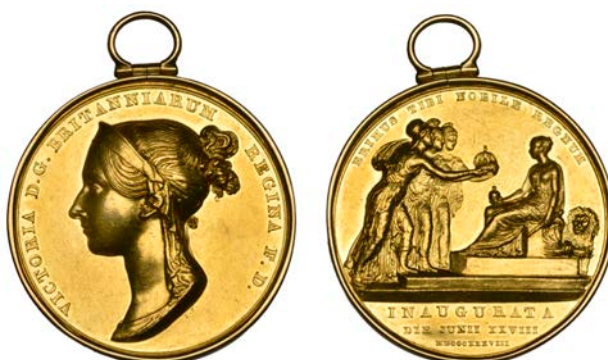
1552 Coronation of Victoria, 1838 , a gold medal by B. Pistrucci, diademed bust left, rev. Victoria seated left, being offered the crown by Britannia, Scotia and Hibernia, 37mm, 34.10g (BHM 1801; E 1315). In a loose fitting gold mount, looped at 12 o'clock for suspension, discreet test mark in obverse field, otherwise good very fine £2,400-£3,000