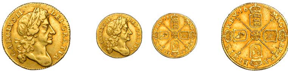
1207 Half-Guinea, 1677 (S 3348). Weak on last two digits of date, otherwise about very fine, scarce