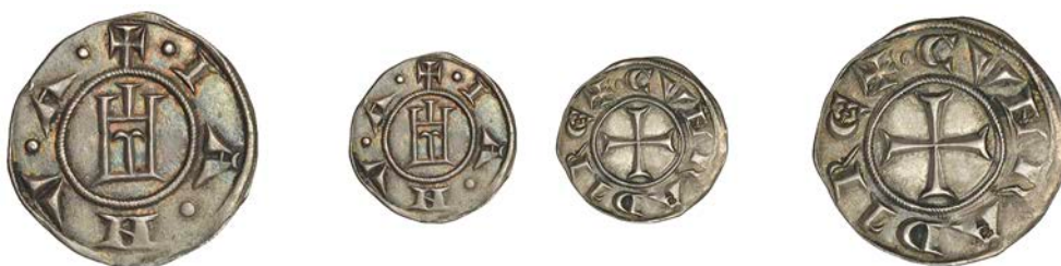
1474 GENOA, Republic , c. 1300, Grosso da 6 Denari, stylised castle, rev. cross pattée, 1.64g/3h (MIR 12; Biaggi 838). Very fine or better, toned £150-£200