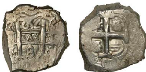
1410 Ferdinand VI, Cob 8 Reales, 1752p q, Potosi, 29.12g/1h (Cal. 522; KM 40). Extremely fine for type, rare