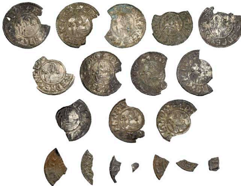
A lost parcel of CRVX Pennies from the 1886 Iselworth Hoard