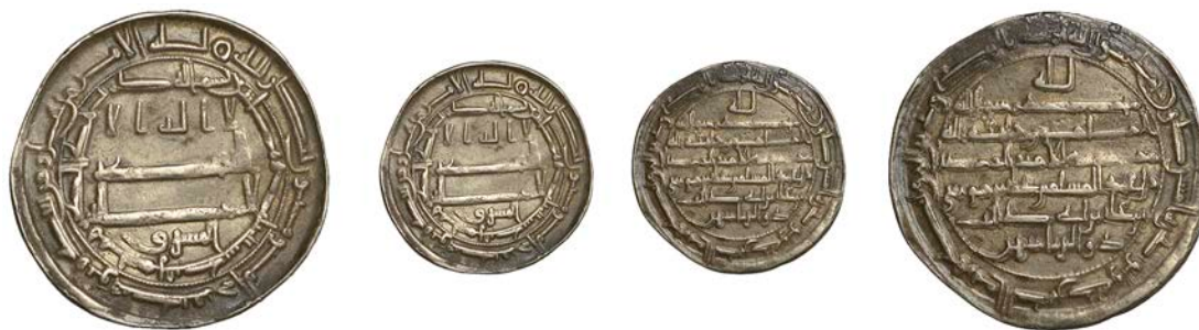
1509 al-Ma'mun , Dirham, Samarqand, 203h citing the Shi'ite Imam 'Ali b. Musa al-Rida as heir, 2.86g/7h (A 224). Very fine or better, rare £240-£300

Provenance: Baldwin Auction 94, 6 May 2105, lot 1582