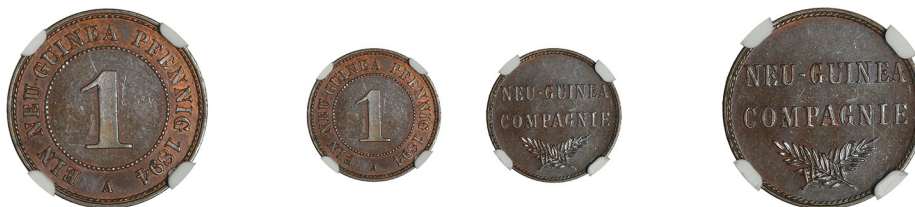
1429 Wilhelm II , Pfennig, 1894A, Berlin (KM 1). Toned with an attractive blue patina, good extremely fine [Graded by NGC as MS 64 BN] £100-£120