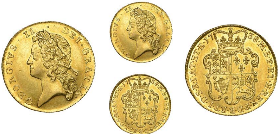
1234 Two Guineas, 1738, eight strings to harp (EGC 569; S 3667B). Lustrous with strong eye appeal, extremely fine [Graded NGC as MS 62]