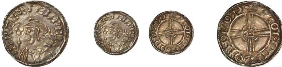
1076 Penny, Expanding Cross type, [Heavy issue], Thetford , Leofwine, LEOFFINE ON DEOD, 1.67g/6h (Freeman 175; SCBI Copenhagen 1231; N 820; S 1177). Full and round, very fine or better, rare £300-400