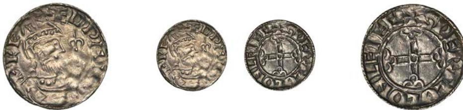
1077 Penny, Pointed Helmet type, Chester , Svartkollr, SPERTLOC ON LEIEC, bust C, 1.29g/12h (Freeman 196; SCBI Chester 330; N 825; S 1179). Good very fine, rare £300-£400