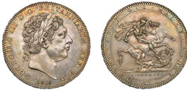
1288 Crown, 1819, edge lx (ESC 2013; S 3787). Toned, almost extremely fine [Graded by NGC as MS 60]