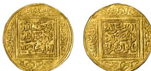
1512 temp. Abu Yahya Abu Bakr (642-656h), Dinar, anonymous type, no mint or date, 4.67g/12h (Hazard 690; A 520). Nearly extremely fine, rim nick at 10 o'clock £400-£500