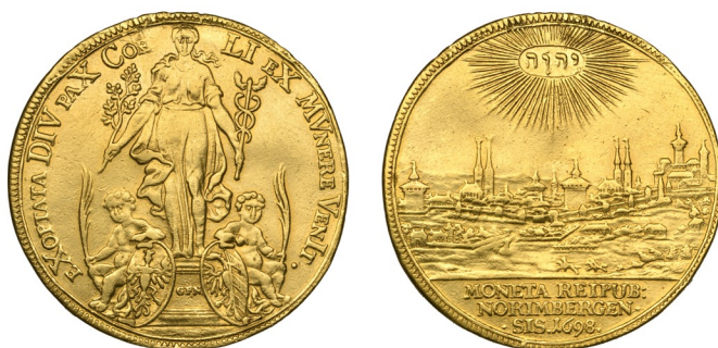
1435 NUREMBERG, 5 Ducats, 1698, The Peace of Rijswijk or 50th Anniversary of the Peace of Westphalia, City view from the east, Jehova above in Hebrew script, rev. Pax on pedestal holding olive branch and mercury staff, two geniuses holding palm branches and shields at base, 16.63g (Fr. 1873; Kellner 266). Ex-jewellery with associated edge repair, otherwise very fine very rare [with NGC slab tag 'Altered Surface'] £3,000-£4,000

The attribution of this piece has long been debated by numismatists. The common belief is that the coins were struck to commemorate the The Peace of Rijswijk on the 29th September 1697, ending the War of the Palatinate Succession (1688-97). Recent theories, however, suggest that the current coin commemorates the 50th Anniversary of the Peace of Westphalia in October 1648, ending the 30 Years' War. Regardless of the reasoning behind it, this coin remains one of the rarest and most sought after pieces of 17th century German numismatics, rarely coming up for sale in any condition.