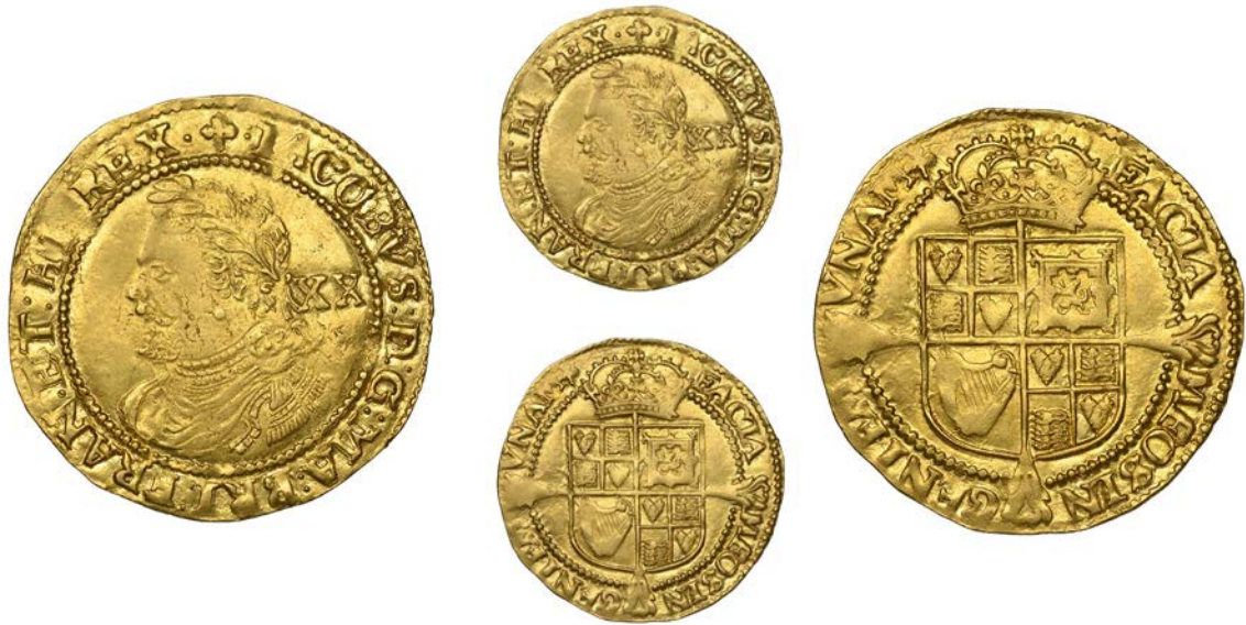
1153 Third coinage, Laurel, mm. trefoil [1624], 9.09g/5h (SCBI Schneider –; N 2114; S 2638B). Some surface crazing, otherwise about very fine £1,200-£1,500