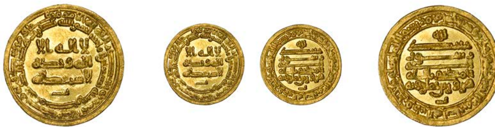
1513 Harun b. Khumarawayh , Dinar, Misr, 290h, 4.01g/1h (A 667.2; Bernardi 230De). Good extremely fine, virtually as struck