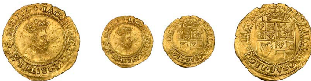
1151 Second Coinage, Crown, mm. lis [1604-5], first bust, 2.49g/12h (SCBI Schneider 43-4; N 2090; S 2624). Jagged edges with some scattered marks in obverse field, otherwise very fine £600-£800