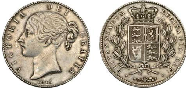
1318 Crown, 1845, edge VIII, cinquefoil stops (ESC 2564; S 3882). Reverse nearly very fine, obverse better but with light marks and scratches £200-£260