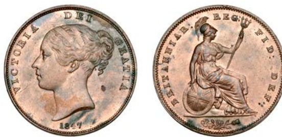
1343 Penny, 1847, far colon (BMC 1493; S 3948). A few surface marks and stains, otherwise extremely fine with some original colour