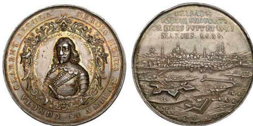
1595 SAXONY, Capture of Breisach by Bernhard of Saxe-Weimar , 1638, a silver medal by J. Blum, bust three-quarters left, rev. view of Breisach and fortifications, 53mm, 54.55g (Merseb. 3860). Small piercing on edge at 12 o'clock, otherwise attractively toned, good very fine £500-£700