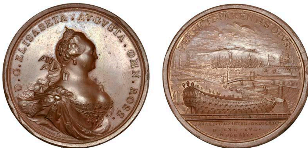
1574 Opening of the Naval Dockyard in Kronstadt, 1752 , a bronze Medal by T. Ivanov, crowned and draped bust right, rev. view of Kronstadt harbour with a ship under construction, canal with bridge in background, 62mm, 92.28 (Diakov 93.2). Struck in particularly high relief on a slightly irregular flan, practically as struck, scarce [Graded by NGC as MS 63 BN] £120-£150