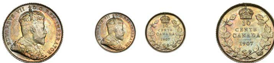
1417 Edward VII , 10 Cents, 1907, London (KM 10). Beautifully toned and lustrous, practically as struck [Graded by NGC as MS 64] £150-£200

The Northwest Company was one of the most significant institutions involved in the North American fur trade during the late 18th and 19th centuries. Founded in Montreal in 1779, the Company grew to be the biggest competitor to the Hudson Bay Company. This token was issued in 1820, and valued at one beaver pelt, exchangeable in one of the Company's many outposts and supply stations in the Columbia and Oregon territories. The following year the company merged with the Hudson Bay Company, making this token a one year type. The tokens are believed to have been struck in Birmingham, by John Walker & Co, with examples most commonly struck in brass. This copper issue, therefore, is one of the rarest and most sought after examples of pre-federal Canadian currency.