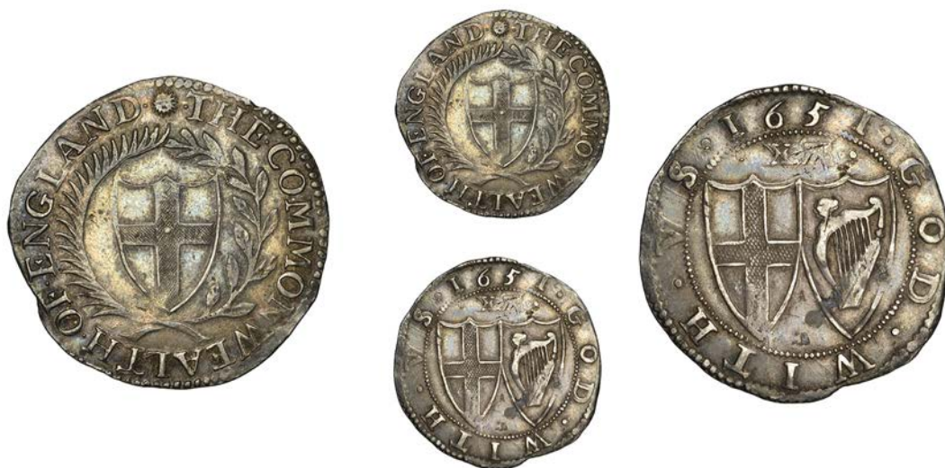
1199 Shilling, 1651, mm. sun on obv. only, 6.04g/10h (ESC 79; N 2724; S 3217). Some surface deposits, better than very fine, iridescent tone £400-£500