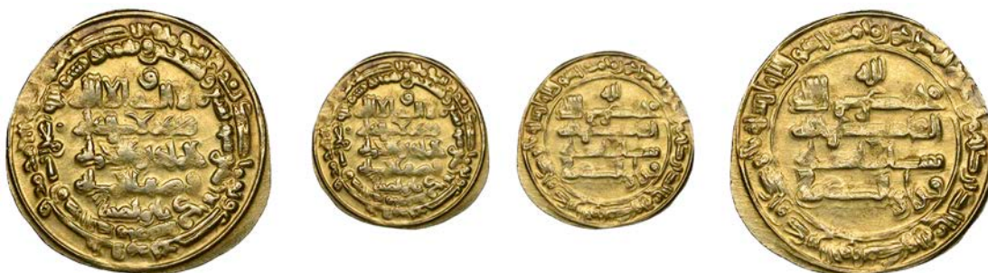
1528 Baha' al-dawla , Dinar, Suq al-Ahwaz 399h, 3.80g/12h (A 1573). Good very fine