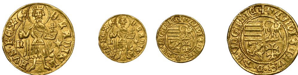
1447 Ladislav I Jagello (1440-4), Forint or Goldgulden, c. 1440-44, mm. n and star, Nagybanya mint, 3.50g/6h (Lengyel 22/2A; ÉH 466; Huszár 597). Good very fine, rare £800-£1,000