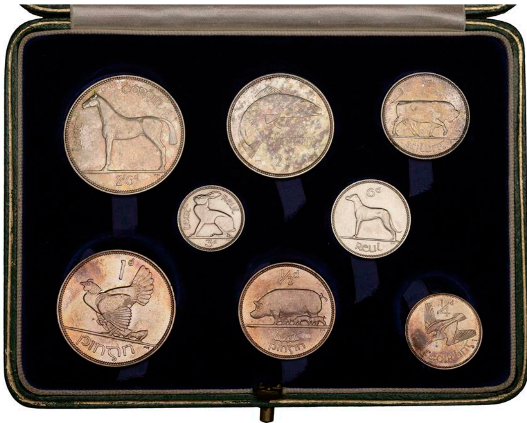
1374 Proof set, 1928, comprising Halfcrown to Farthing [8]. Good extremely fine, some toning; in official green leatherette case of issue £400-£500