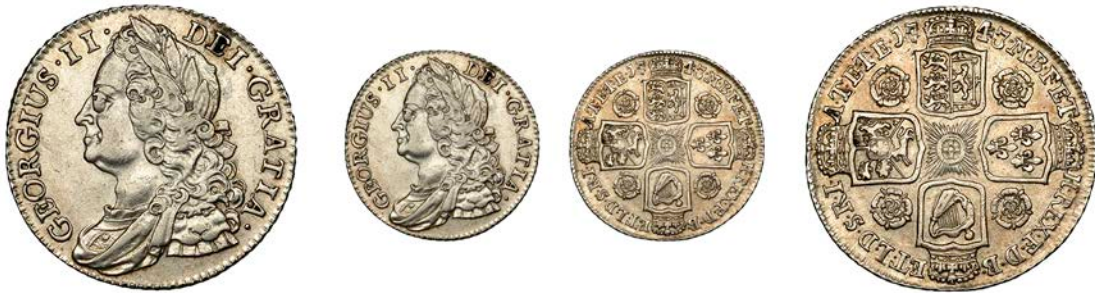
1244 Shilling, 1743, roses (ESC 1720; S 3702). Of bright appearance, very fine