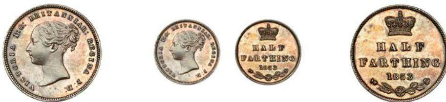
1349 Proof Half-Farthing, 1853, copper, edge plain, 2.35g/12h (Cooke 1624; BMC 1601; S 3951). Uneven artificial tone, extremely fine £120-£150