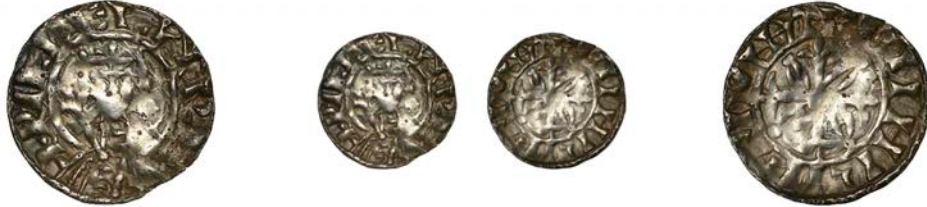
1086 Penny, Cross Fleury and Piles type [BMC V], Thetford , Burhard, BIHRÆED ON OT, 1.30g/6h (Allen 2022, p.182; N 856; S 1262). Small dent by edge, otherwise fine and rare £1,000-£1,200