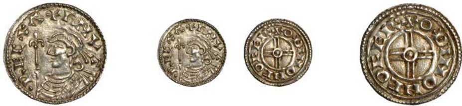
1067 Penny, Short Cross type, York , Authunn, ODIN ON EOFR', 1.14g/9h (BEH 715; N 790; S 1159). Good very fine, the portait well struck up, light toned £400-£500