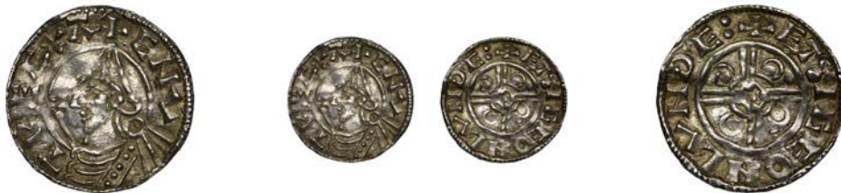
1066 Penny, Pointed Helmet type, London , Etsige, ETSIGE ON LVNDE., 1.03g/9h (BEH 2338; SCBI Copenhagen 2511, same dies; N 787; S 1158). Peckmarked with resulting crimping, very fine and toned £240-£300