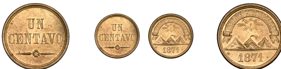
1440 Republic, Un Centavo, 1871, Guatemala City (KM 196). Lustrous, mint state, rare thus [Graded by NGC as MS 64 RB] £100-£120