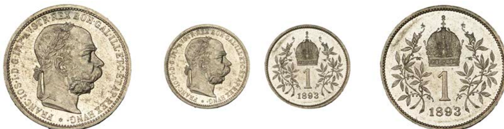
1408 Franz Joseph I, Corona, 1893, Vienna (Schön 7; KM 2804). Lustrous with prooflike fields, good extremely fine [Graded by NGC as MS 62]