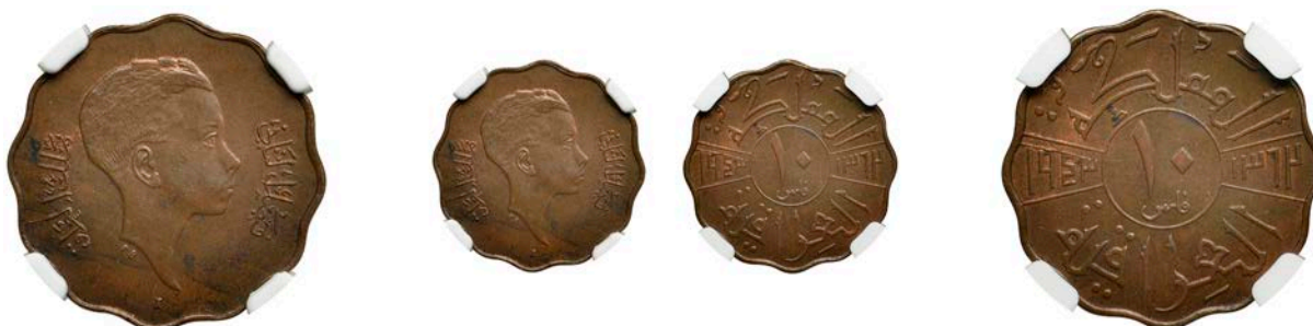
1472 Faisal II, 10 Fils, AH 1362 (1943), Bombay (KM 108). Toned, extremely fine, rare [Graded by NGC as MS 63 BN] £200-£300