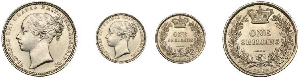
1333 Shilling, 1869, die 4 (ESC 3037; S 3906A). Bright, extremely fine, scarce