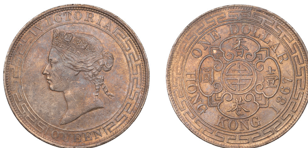
1442 Victoria, Dollar, 1867, 27.20g/6h (Prid. 2; KM 10). Almost extremely fine, attractive (but possibly artificial) tone