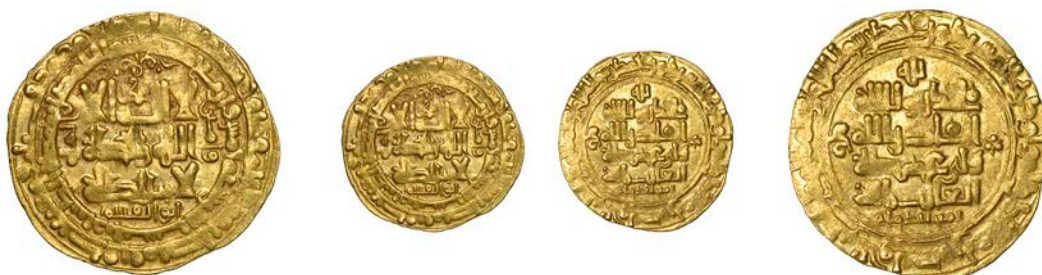
1529 Mahmud b. Sebuktekin , Dinar, Nishapur 405h, 3.62g/3h (A 1606). Good very fine