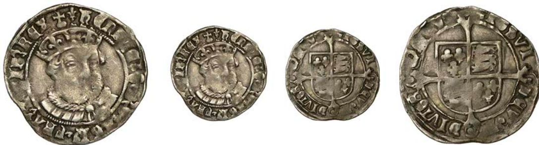
1128 Third coinage, Groat, Tower, mm. lis, bust 2, pellet-in-annulets in forks, 2.48g/10h (N 1844; S 2369). A little weak on the bust, otherwise good fine, attractive old cabinet tone £200-£260

Provenance: C.E. Blunt Collection [Shirley-Fox Bequest 1939]; Lord Stewartby Collection, Part V, Spink Auction 243, 28 March 2017, lot 1642 (part)