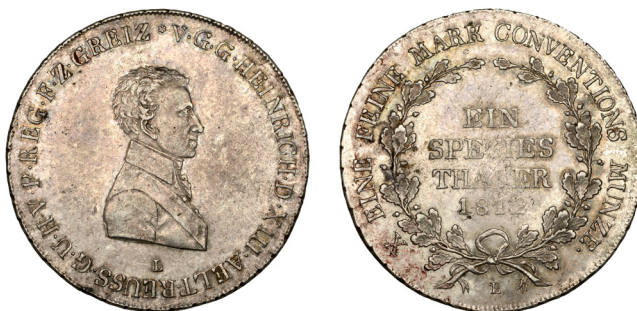
1437 REUSS-OBERGREIZ, Heinrich XIII, Thaler, 1812, Saalfeld (Dav. 796; J. 40; KM 101). Toned, good very fine, rare £400-£500