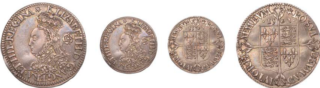
1141 Milled coinage, Sixpence, 1562, mm. star, bust D, broader bust, decorated dress, small rose, 3.25g/7h (Borden/Brown 25, O10/R6; N 2027; S 2596). Good very fine and toned £400-£600

Provenance: Spink Auction 224, 26-7 March 2014, lot 1462; Covent Garden Collection