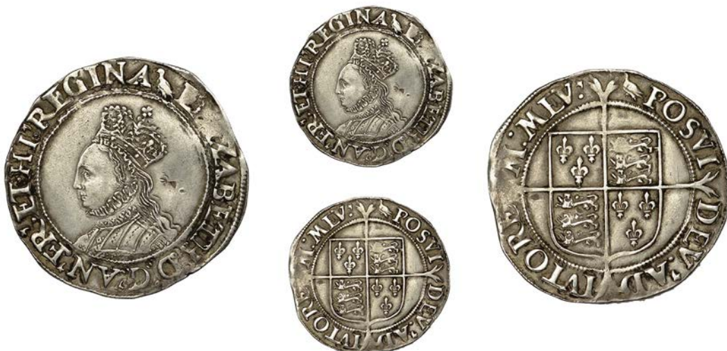
1133 Second issue, Shilling, mm. martlet, bust 3C, reads ELIZABETH D G AN FRA ET HI REGINA, coarse beading, 6.16g/1h (N 1985; S 2555). Some marks in field behind the bust, otherwise very fine, strong portrait £300-£400