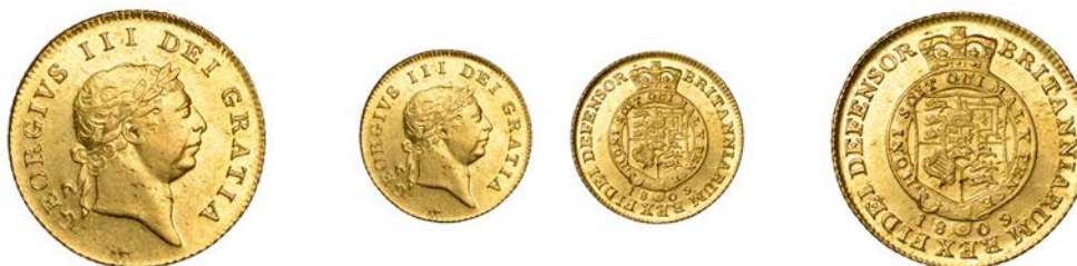
G 1256 Half-Guinea, 1809, seventh bust (EGC 854; S 3737). Some haymarks and light hairlines, otherwise lustrous, extremely fine £500-£600