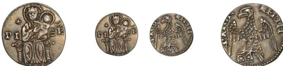
1478 PISA, Republic (c. 1270-1312), Grosso or Aquilino Minore, mm. star, imperial eagle, rev. Madonna and Child, 1.80g/3h (MIR 403; Biaggi 1936). Slightly small of flan, otherwise good very fine and toned £150-£200