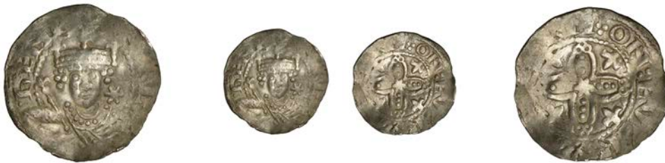
1087 Penny, Pellets in Quatrefoil type [BMC XIV], York , Forn, [—]RN ON EVERW[—], 1.31g/10h (Allen 948; BMC —; N 870; S 1275). Flan crimped with resulting weakness, good fine, rare £400-£600