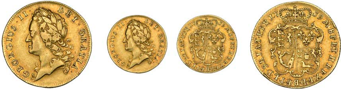
1238 Guinea, 1739 (MCE 315; Bull 598; S 3676). Edge bumps on reverse, good fine, scarce