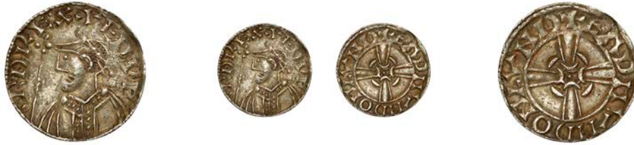
1075 Penny, Expanding Cross type, [Light issue], London , Eadmund, EADMUND ON LVND, 1.08g/9h (Freeman 295; BMC 923; N 820; S 1176). Better than very fine, surfaces slightly rough £240-£300