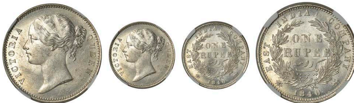
1467 EIC, Victoria, Rupee, 1840, type II, Calcutta or Bombay (SW 3.33; Prid. 56). Lustrous, extremely fine [Graded by NGC as MS 63]