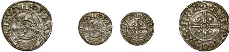
1064 Penny, Pointed Helmet type, London , Ælfgeat, ÆLFGEAT : ON LVNDE, 1.06g/12h (BEH 1888 var. [b2]; SCBI Copenhagen 1994, same dies; N 787; S 1158). Better than very fine, dusty patina £240-£300