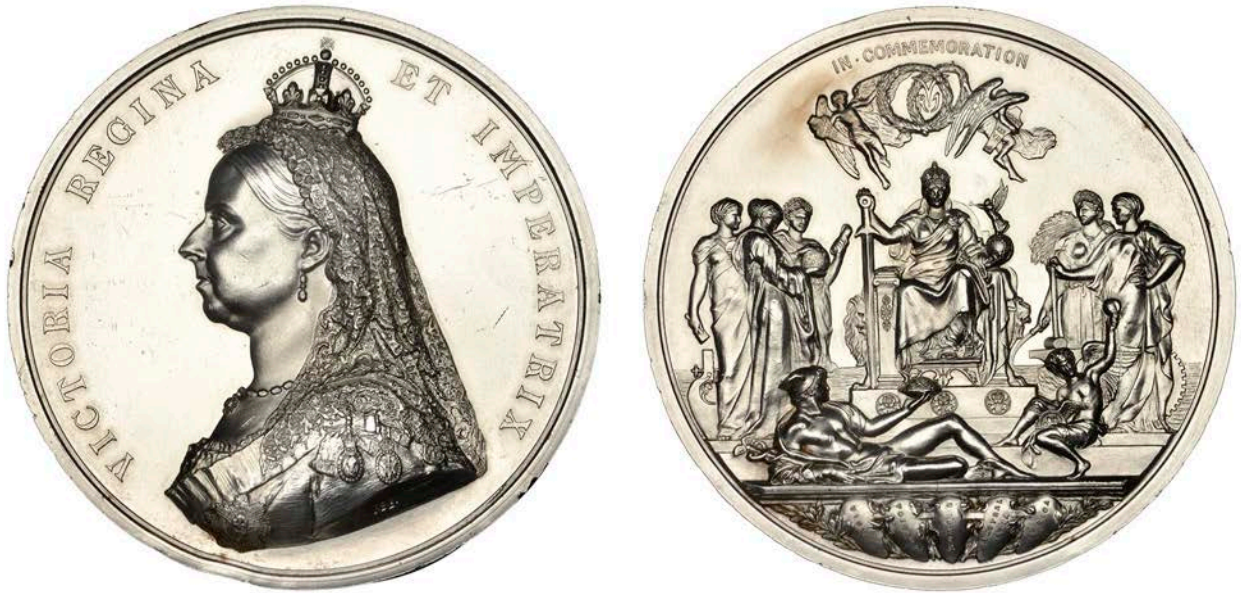
1559 Victoria, Golden Jubilee, 1887 , a silver medal by L.C. Wyon after Sir J.E. Boehm and Sir F. Leighton, crowned bust left, rev. enthroned figure of Empire surrounded by standing figures representing Science, Letters, Art, etc, Mercury and Time below, 77mm, 207.23g (W & E 2000A.2; BHM 3219; E 1733b). Cleaned, edge bruise, otherwise extremely fine; cased with card insert £700-£900