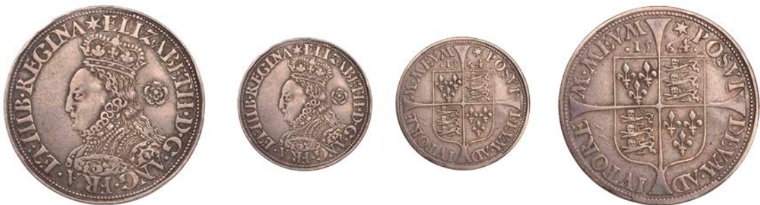
1145 Sixpence, 1564/3, mm. star, bust D, broad bust, elaborate dress, small rose, curly z in ELIZABETH, cross pattée on rev., pellet borders, 2.98g/7h (Borden/Brown 33, O1/R1; N 2028; S 2598). Very fine and toned, rare £300-£400

Provenance: J.M. Ashby Collection, Spink Auction 145, 12-14 July 2000, lot 2261; W. Wilkinson Collection, DNW Auction 148, 18-20 September 2018, lot 486; Covent Garden Collection