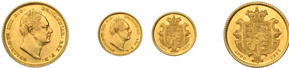
G 1306 Half-Sovereign, 1835 (Marsh 411; Bull 1041; S 3831). Lustrous, extremely fine