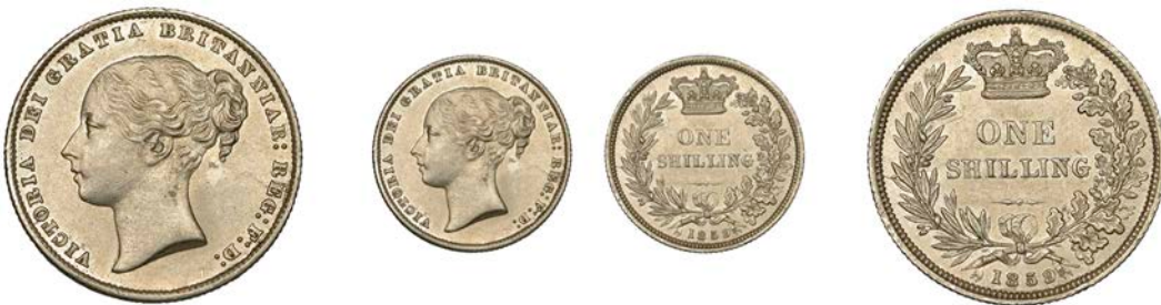
1331 Shilling, 1859 (ESC 3015; S 3904). Almost extremely fine or better, a few light obverse surface marks