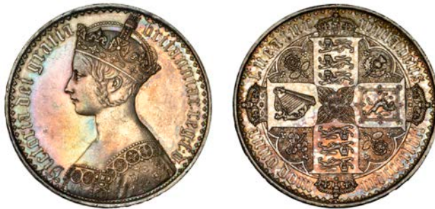
1320 'Gothic' Crown, 1847, edge UNDECIMO (ESC 2571; S 3883). Hairlines in fields with mottled reverse toning, otherwise about extremely fine, rare [Graded by NGC as Proof Details, Cleaned] £1,500-£2,000