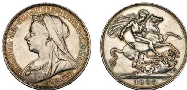
1322 Crown, 1898, edge LXI (ESC 2604; S 3937). Some rim and surface marks, extremely fine with lightly reflective fields £240-£300