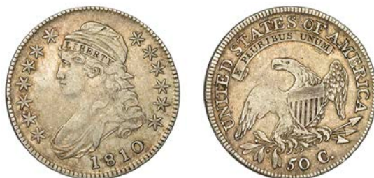
1498 Half-Dollar, 1810. Nearly very fine