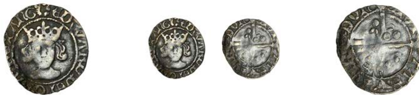
1122 Penny, type XXII, London, mm. halved sun-and-rose, reads EDWARD DEI GRA REX ANG, 0.72g/8h (Stewartby p.444; N 1641; S 2147). Double struck on the reverse and with a slight curve to flan, otherwise fine and toned, with the mint mark and king's name remarkably clear, extremely rare thus £2,000-£2,600