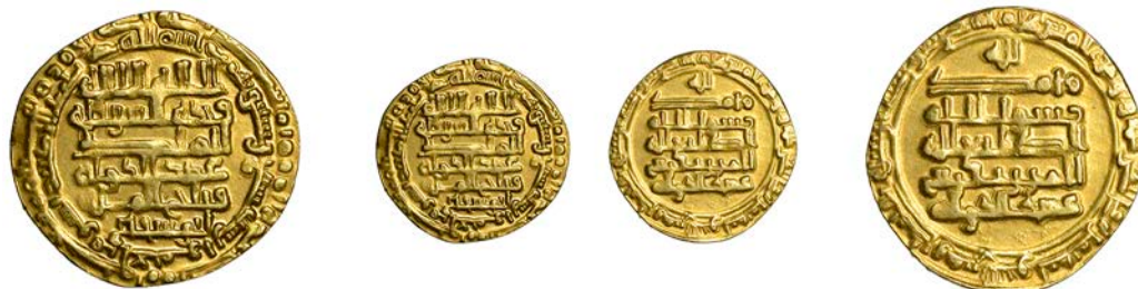
1525 Samsan al-dawla al Marzuban , as Governor of Khuzistan, Dinar, Suq al-Ahwaz 367h, citing 'Adud al-Dawla as overlord, 4.38g/9h (A 1567). Slightly blunt strike, about extremely fine

Provenance: Spink Auction 236, 22-3 March 2016, lot 1284