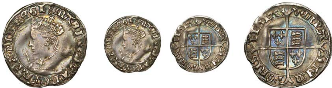
1131 Groat, mm. pomegranate, reads FRA Z HIB REGI, 1.99g/10h (N 1960; S 2492). Crimped, very fine, attractively toned £300-£400