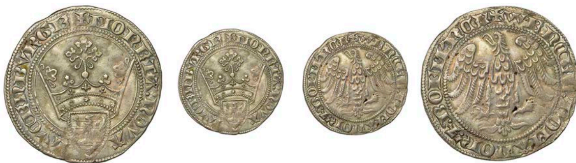
1487 Wenceslas II, Gros (Gans), c. 1384-88, eagle, rev. small shield of Luxembourg beneath large imperial crown, 3.03g/2h (Weiller 154; Probst L163-1). Better than very fine £200-£260