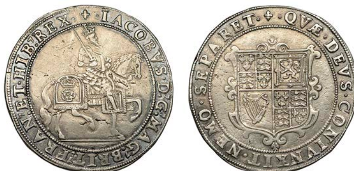
1158 Second coinage, Crown, mm. lis [1604-5], 29.22g/12h (FRC dies IV/VI [Sale, lot 21]; N 2097; S 2652). Faint cross scratched into obverse field, otherwise good fine, the horseman clear £900-£1,200