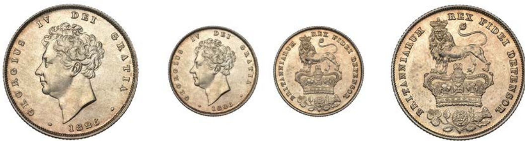
1301 Shilling, 1826 (ESC 2409; S 3812). A superb and lustrous example with an attractive pink hue, mint state [Graded by NGC as MS 65] £200-£300