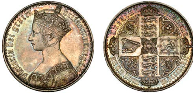
1319 'Gothic' Crown, 1847, edge UNDECIMO (ESC 25711; S 3883). Some nicks and hairlines, otherwise good very fine, rare [Graded by NGC Proof AU Details Obv Cleaned] £1,200-£1,500