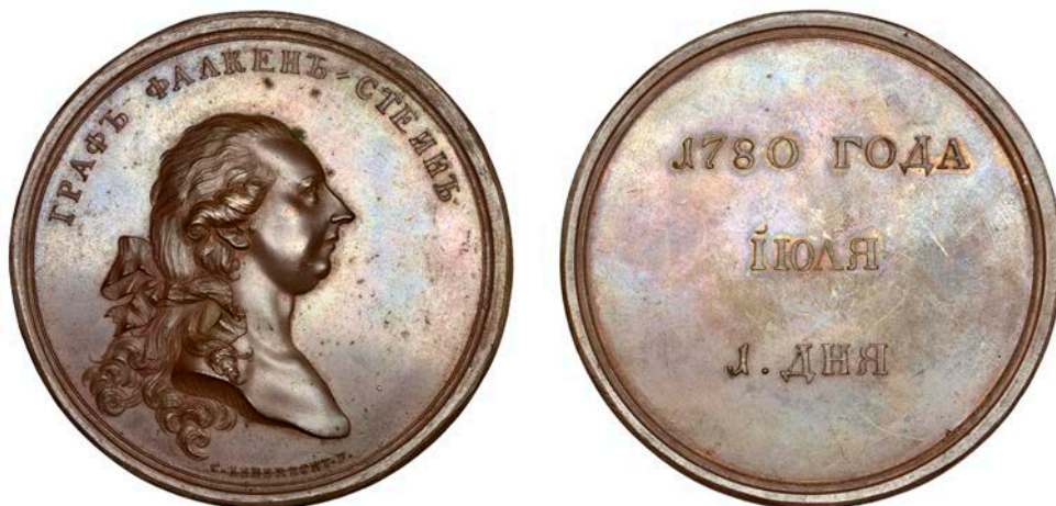
1582 Visit of Emperor Joseph II of Austria to Russia, 1780 , a bronze Medal by J.C.G. Jaegar, bare bust right, rev. date and inscription and three lines, 61mm, 79.75g (Diakov 185.1). Lightly wear on cheek, otherwise practically as struck, toned [Graded by NGC as MS 63 BN] £100-£120