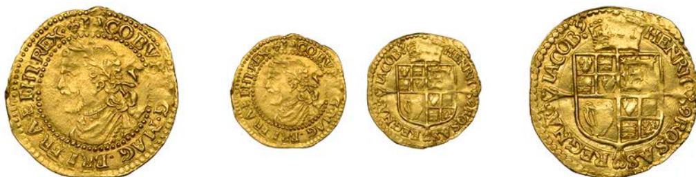
1157 Third Coinage, Quarter-Laurel, mm. lis [1623-4], 2.27g/8h (SCBI Schneider 98; N 2118; S 2642). Some slight weakness on reverse, otherwise very fine or better £400-£500