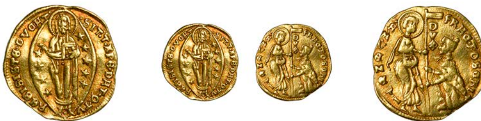
1482 VENICE, Francesco Foscari (1423-1457), Ducat, 3.48g/12h (Paolucci 1; F 1232). Slightly creased and struck on an irregular flan, nearly very fine £180-£220