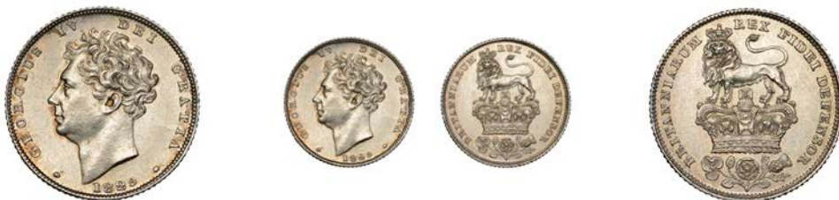
1303 Sixpence, 1829 (ESC 2439; S 3815). A few minor rim nicks, extremely fine £340-£400