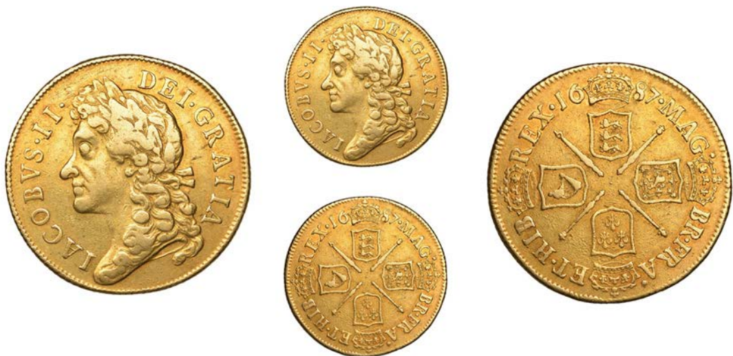
1210 Two Guineas, 1687 (EGC 318; S 3399). Light hairlines, about very fine, reddish tone