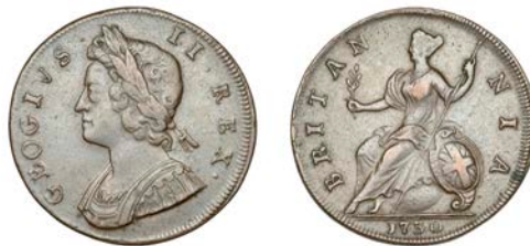
1245 Halfpenny, 1730, reads GEORGIVS, no stop on rev. (BMC 837; S 3717). Very fine