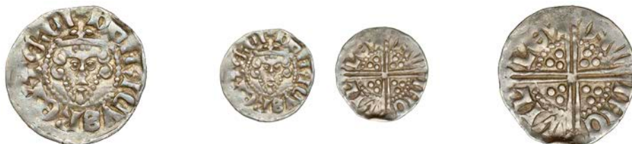
1096 Long Cross coinage, Penny, class IIb, Winchester , Willem, WILLEM ON WINC, 1.40g/10h (N 985/2; S 1351A). Flat in peripheries, otherwise very fine or better, toned £100-£120

Provenance: G.V. Doubleday Collection, Glendining Auction, 8 June 1988, lot 1064