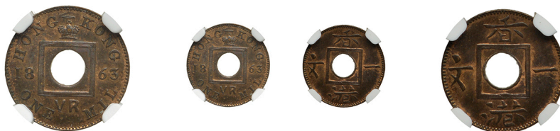
1441 Victoria, Mil, 1863 (Prid. 193; KM 1). Extremely fine with traces of original colour [Graded by NGC as MS 64 BN]