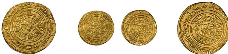
1519 al-Nasir Salah al-din Yusuf, Dinar, al-Qahira 583h, 4.62g/4h (Balog 43; A 785.2; ICV 890). Traces of mounting, otherwise good very fine