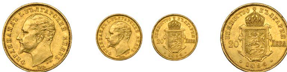
1414 Ferdinand I , 20 Leva, 1894кв, Kremnica (KM 20). Toned with some scuffs, otherwise very fine or better, scarce £600-£700