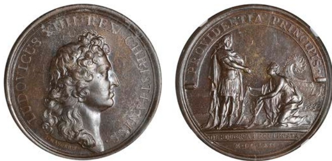
x 1592 FRANCE, Acquisition de Dunkerque, 1662 , a copper medal by J. Mauger, bust of Louis XIV right, rev. presentation of the city scroll to Louis, 41mm (Divo 71). Brilliant mint state [slabbed NGC MS 65 BN] £150-£200