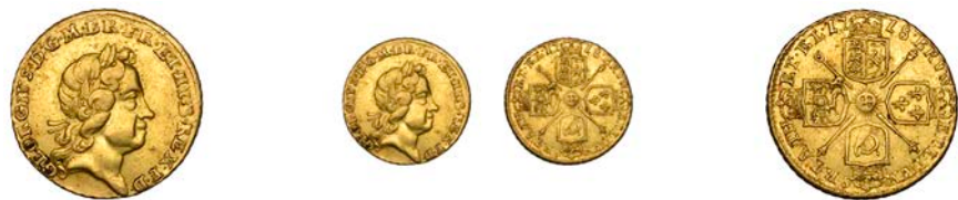
1231 Quarter-Guinea, 1718 (EGC 550; S 3638). Good very fine, reverse better £200-£300 Provenance: A. Mint Collection