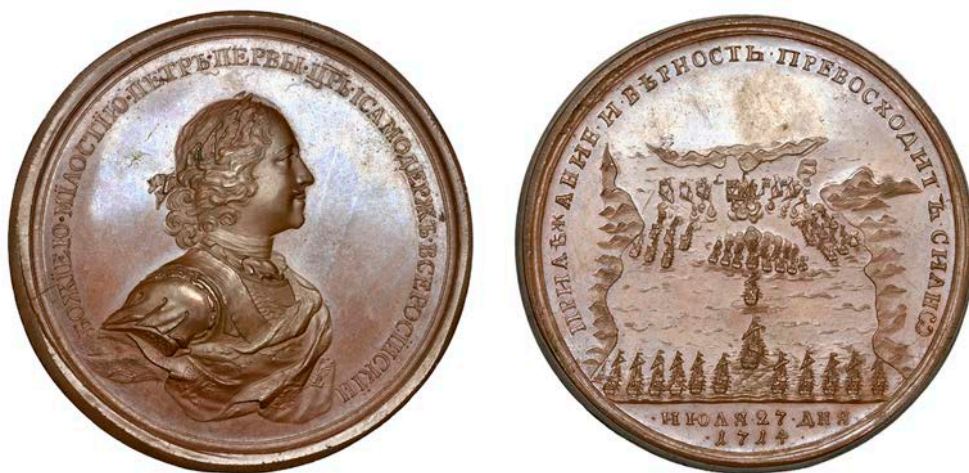
1567 Naval Victory at Gangut, 1714 , a bronze Medal by M. Kuchkin, laureate, draped and armoured bust right, rev. battle scene depicting opposing fleets, 60mm, 99.72g (Diakov 47.9). Pleasing prooflike surfaces, particularly on the reverse, practically as struck, rare [Graded by NGC as MS 64 BN] £150-£200

Based on the eponymous painting by Maurice Baquoy.