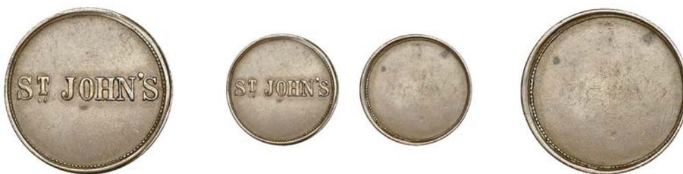
1415 NEWFOUNDLAND, St John's , uncertain issuer, copper Farthing, ST JOHN'S, rev. blank, 22mm, 3.11g (Charlton –; KM. –). Very fine and extremely rare £800-£1,000

Only two other specimens believed known, one in the Bank of Canada Museum in Ottawa, the other, in far inferior condition, dispersed in trade in 2016