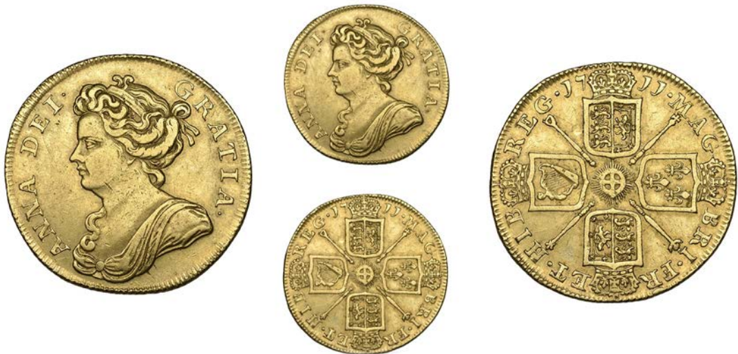
1219 Two-Guineas, 1711 (MCE 206; Bull 455; S 3569). Good fine