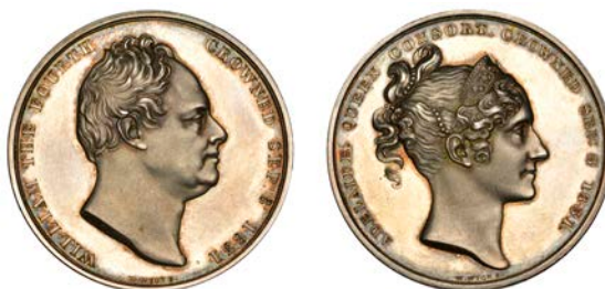
1549 Coronation of William IV and Queen Adelaide, 1831 , a silver medal by W. Wyon, bust right, rev. bust of Queen Adelaide right, 33mm, 17.82g (BHM 1475; E 1251). Lightly toned in peripheries with some hairlines, extremely fine £120-£150

Provenance: Sold for the benefit of Oxfam