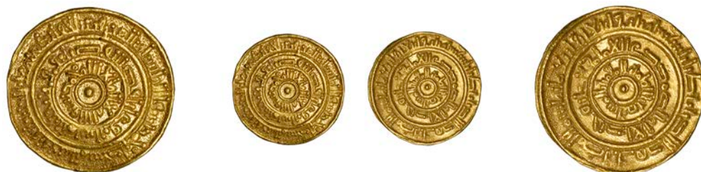
1515 al-Mustansir , Dinar, Trablus 443h, 3.96g/9h (Nicol 1998; A 719.2). Good very fine but slightly bent