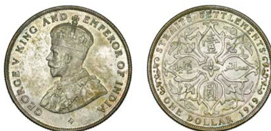
1492 George V, Dollar, 1919, Calcutta (KM 33; Dav. 305). Lightly toned with underlying lustre, extremely fine £100-£120