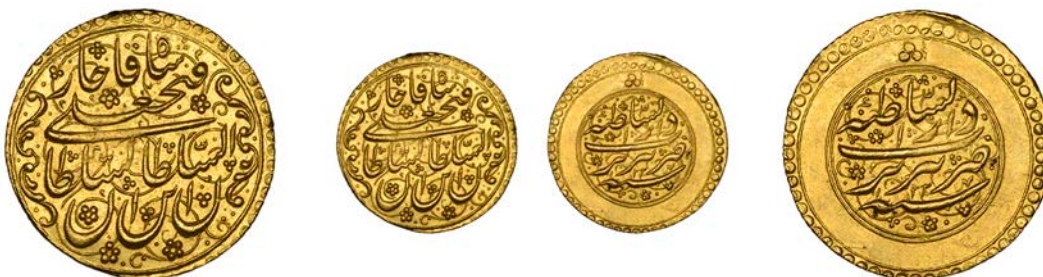
1471 Fath 'Ali Qajar, Toman, AH 1224 (1809), type U, Tebriz mint, 5.33g/12h (KM 745.3). Lustrous, good extremely fine, scarce £300-£400