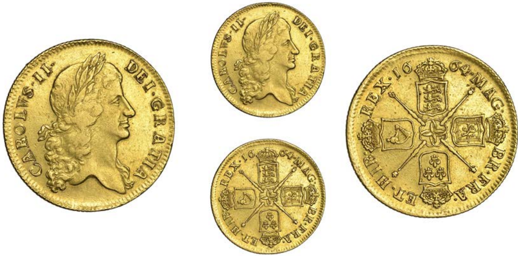
1205 Two Guineas, 1664 (EGC 203; S 3333). Lightly cleaned and about very fine, rare without elephant below bust