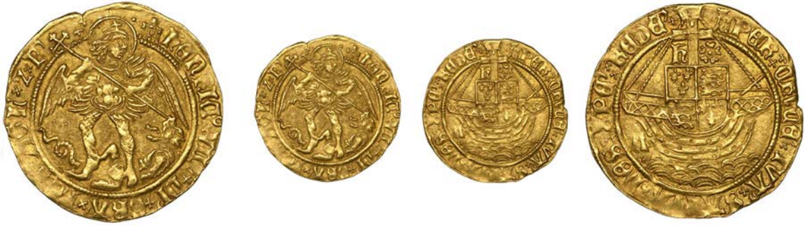
1125 First Coinage, Angel, mm. castle, 5.12g/10h (SCBI Schneider 558; N 1760; S 2265). Possibly removed from a mount with discreet edge mark at 11 o'clock, otherwise good very fine £2,000-£2,600