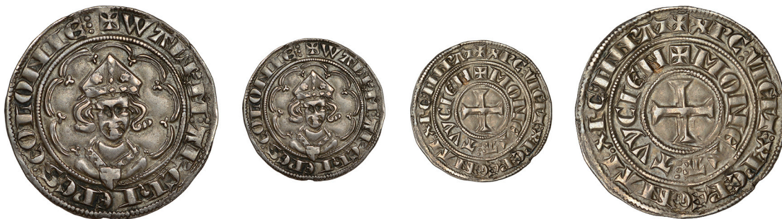
1431 COLOGNE, Walram von Jülich , Turnose, c. 1343, Deutz, facing bust wearing mitre, rev. cross within double inscription, 3.84g/2h (Noss 47ff). Good very fine and toned £200-£260

Provenance: R. Erskine Collection [bt Seaby 1979]