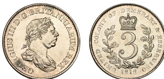
1424 George III, Three-Guilders, 1816, London (KM 15). Hairlined with a bright appearance, otherwise extremely fine [Formerly graded by NGC as MS 61, accompanied by original grading slip] £800-£1,000

Provenance: Dallas Signature Sale, Heritage Auction 3091, 6-7 May 2021, Lot 32387