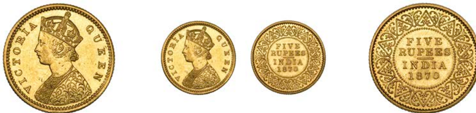
1469 Victoria, Proof Restrike Five Rupees, 1870, type A, Calcutta (S & W 4.23; Prid. 40; KM 476). Hairlined, otherwise good very fine, very rare [Graded by NGC AS PF 58] £800-£1,000