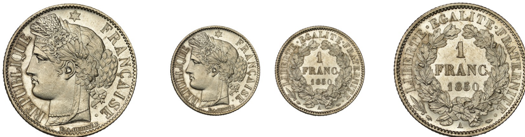
1428 Second Republic , Franc, 1850A, Paris (Gad. 457; F 211). A superb example with full mint bloom, mint state [Graded by NGC as MS64] £120-£150