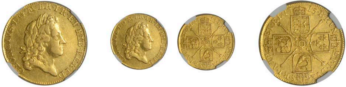
1227 Guinea, 1715, second bust (EGC 503; S 3629). Very fine, some residual brightness [Graded by NGC as AU 50] £1,800-£2,200