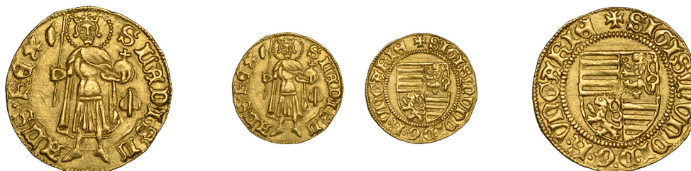
1445 Sigismund (1387-1437), Forint or Goldguilder, c. 1423, mm. spade, without pellets, Kremnitz, 3.59g/9h (cf. Lengyel 18/16; ÉH 446; Huszár 573). Sharply struck, about extremely fine