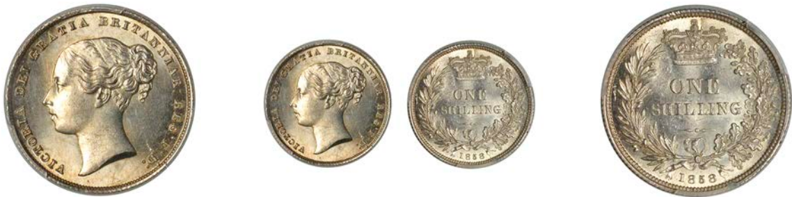
1330 Shilling, 1858, only one stop after REG (ESC 1306; S 3904). Lustrous, mint state, rare [Graded by NGC as MS 64]