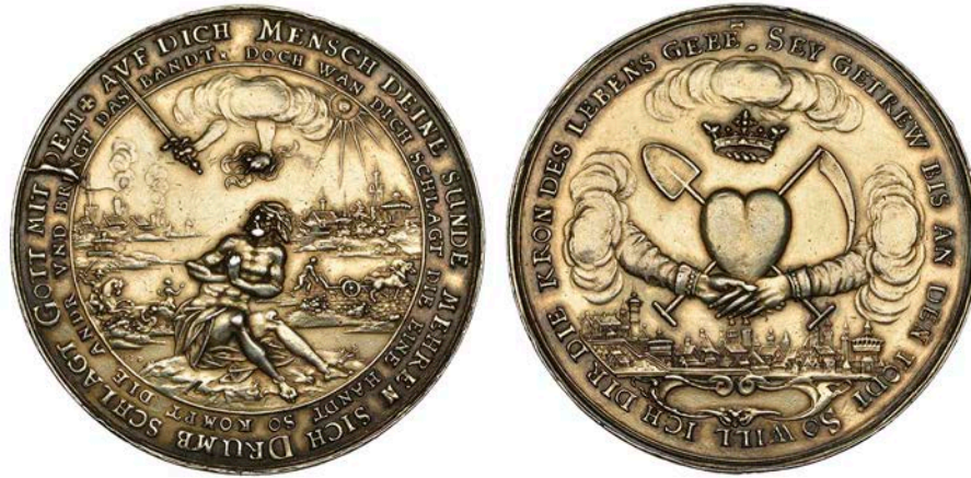
1594 NUREMBERG, Hopes for Peace , c. 1630, a silver gilt medal, by Sebastian Dadler, seated man praying with god above, rev. spade and scythe crossed behind heart, hands reaching out clasping, cityscape below, 56mm, 41.18g (Weicek 87; Pax 1150). Toned, good very fine £600-£800