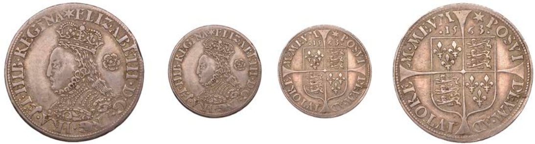
1144 Sixpence, 1563, mm. star, bust D, broad bust, elaborate dress, small rose, curly z in ELIZABETH, cross pattée on rev., pellet borders, 3.28g/7h (Borden/Brown 32, O1/R1; N 2028; S 2598). Light tooling in fields, otherwise very fine, grey tone, very rare £400-£500

Provenance: Bt CNG April 2013; Covent Garden Collection