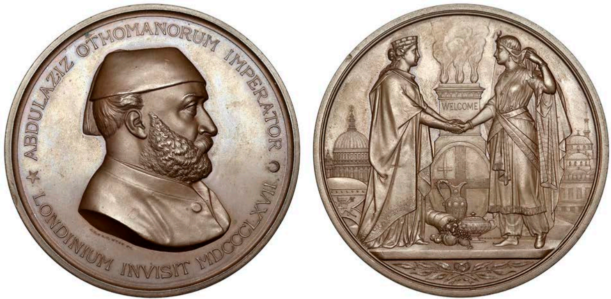
1557 Visit of Sultan Abdul Aziz to the City of London, 1867, a copper medal by J.S. and A.B. Wyon, bust right wearing fez, rev. Londinia greets figure of Turkey, symbolic buildings behind, 76mm (V & E 1065.1; BHM 2872; E 1591). Mint state; in green gilt-blocked case of issue £800-£1,000