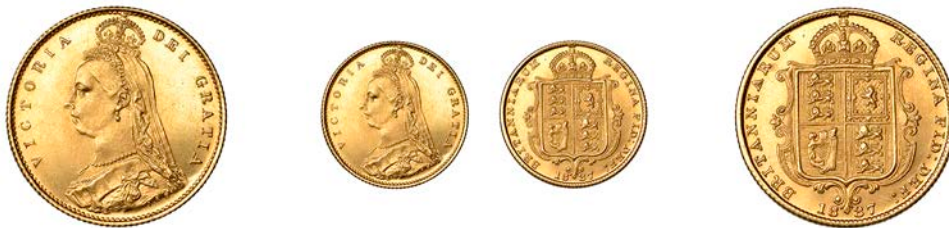
G 1316 Half-Sovereign, 1887 (Hill 478; Bull 1352; S 3869C). Good extremely fine Provenance: G. Lawrence Collection