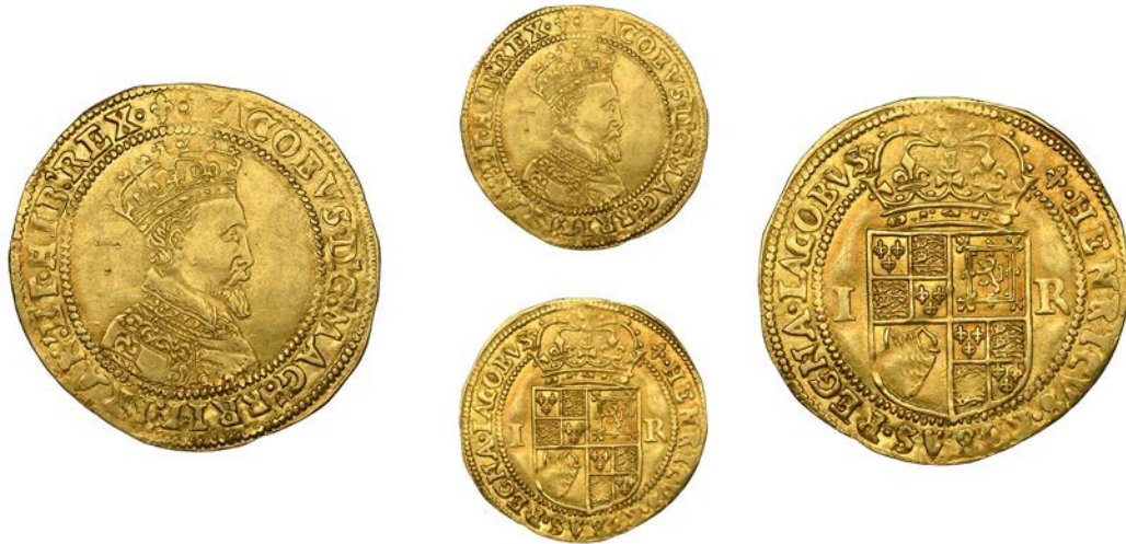
1150 Second Coinage, Double-Crown, mm. lis [1604-5], fourth bust, 4.91g/12h (SCBI Schneider –; N 2086; S 2621). Graffito behind king's head, scratches in reverse field, otherwise nearly very fine, reverse better £500-£700