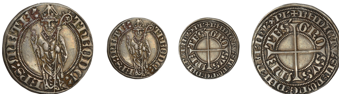
1425 METZ, Thierry de Boppart (1365-84), Gros, bishop standing facing holding crozier, rev. cross within double inscription, 3.28g/11h (Boudeau 1641). Slight bend in flan, very fine, toned £120-£150

Provenance: R. Erskine Collection [bt Spink 1978]