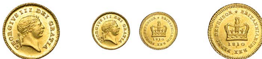
G 1257 Third-Guinea, 1810, second bust (EGC 878; S 3740). Lustrous with good eye appeal, extremely fine