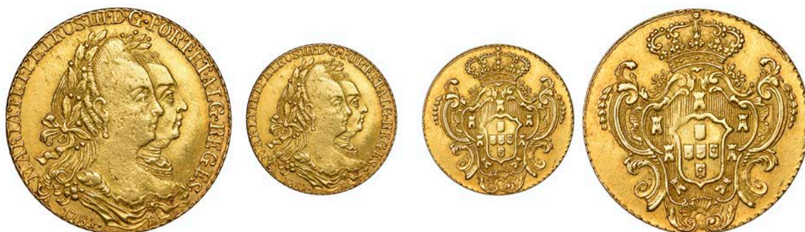
1412 Maria I and Peter III , 6,400 Réis, 1784r, 12.31g/12h (Gomes 25.08; Fr 76; KM. 199.2). Cleaned, very fine £800-£1,000