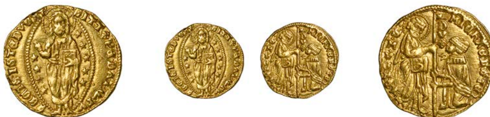
1481 VENICE, Michele Steno (1400-13), Ducat, 3.52g/7h (Paolucci 1; F 1230). Better than very fine £180-£220

Provenance: R. Erskine Collection [bt Coins & Antiquities 1977]