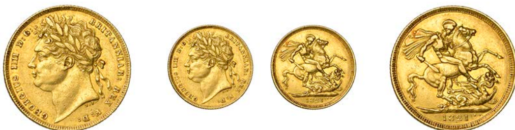
G 1295 Sovereign, 1821 (Hill 5; S 3800). Good fine