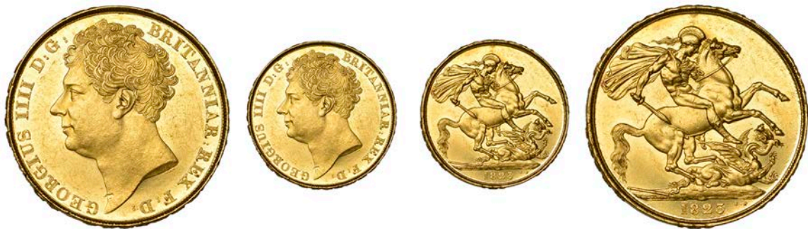
G 1294 Two Pounds, 1823, edge IV (Hill T6; S 3798). Contact marks in fields, otherwise about extremely fine