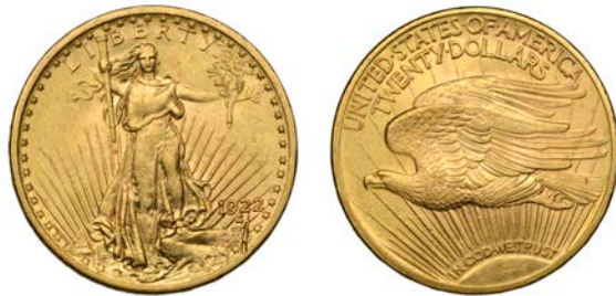
1496 Twenty Dollars, 1922, with motto (KM 131). Lustrous, good extremely fine