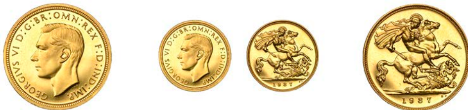
G 1359 Proof Half-Sovereign, 1937, edge plain (Hill 543A; Bull 1457; S 4077). Very minor clouding to fields, otherwise practically as struck [Graded by NGC as PF 65]