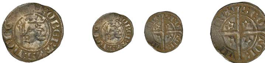
1384 Sterling, mm. cross pattée, class II, bust 1 left, triple pellet stops, colon before ROBERTVS, rev. long cross, four mullets of five points in angles, 1.34g/4h (Holmes/Stewartby 1-A; SCBI 35, 321; B 3, fig. 226; S 5076). Good fine, earthen partina, rare £600-£800