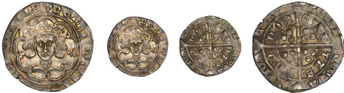
1118 Leaf-Pellet issue [C], Groat, London, mm. cross IIIb on obv. only, leaf on neck, fleur on breast, pellets by crown, extra pellets below TAS and DON, 3.82g/6h (Whitton 56ff; N 1505; S 1917). Very fine or better £150-200

Provenance: DNW Auction 102, 18 September 2012, lot 2456