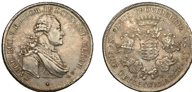
1436 LÖWENSTEIN-WERTHEIM-VIRNEBURG, Karl Ludwig, Thaler, 1770, Wertheim (Dav. 2397; Wibel 154; KM 42). Toned, good fine, rare £300-£400