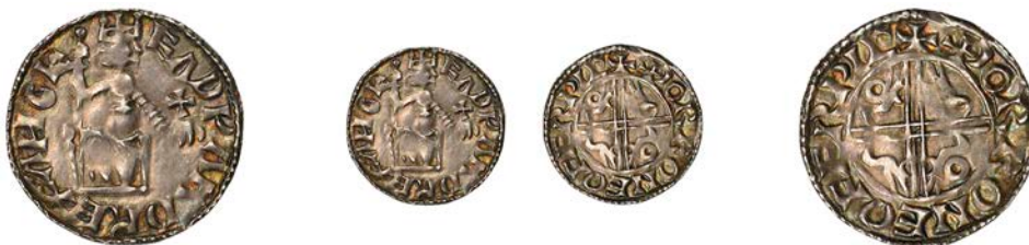
1078 Penny, Sovereign/Eagles type, York , Thorr, DORR ON EOFFERIC, annulets in first and fourth quarters, 1.32g/4h (Freeman 387; SCBI Yorkshire 379; N 827; S 1181). Neatly but with a little striking weakness, very fine with old cabinet toning £300-£360