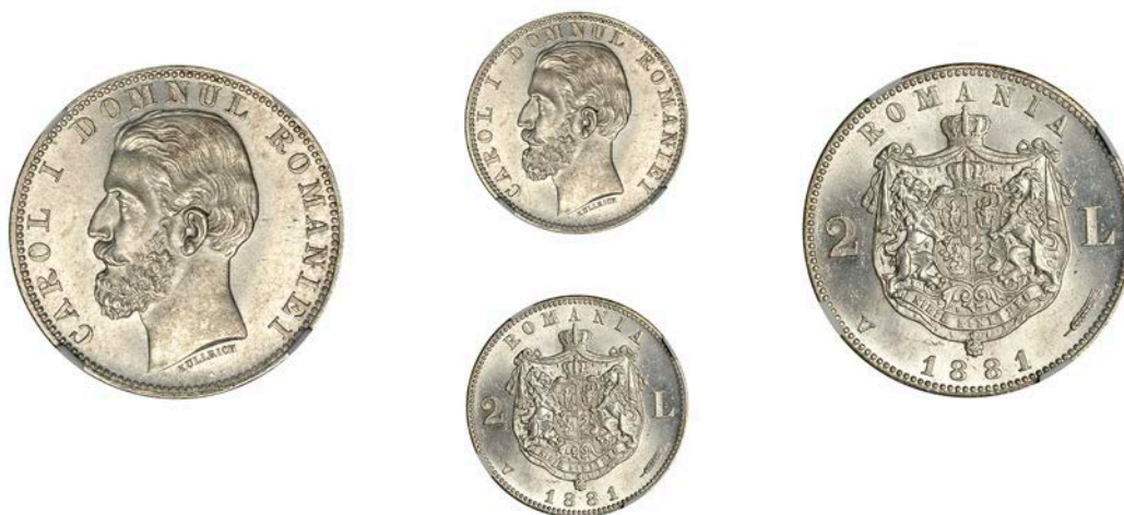
1490 Carol I, 2 Lei, 1881v, Vienna (KM 15). An excellent example of an increasingly popular and scarce denomination, practically as struck, very rare thus [Graded by NGC as MS 65 TOP POP] £800-£1,000

The single highest graded example at either NGC or PCGS. A must-have for Romanian collectors.