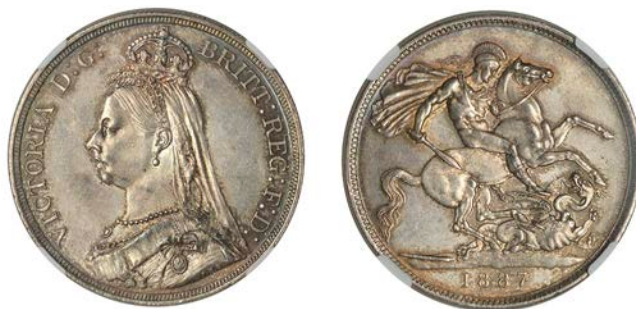
1321 Crown, 1887 (ESC 2585; S 3921). Prettily toned over residual bloom, good extremely fine [Graded by NGC as MS 64] £200-£260