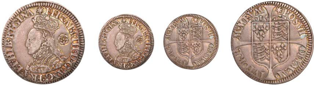
1143 Milled coinage, Sixpence, 1562, mm. star, bust D, broader bust, decorated dress, cross pattée on rev., 3.01g/6h (Borden/Brown 29 [O2/R1]; N 2028; S 2597). A few light surface marks, very fine or better and toned £300-£400

Provenance: W. Wilkinson Collection, DNW Auction 148, 18-20 September 2018, lot 504 [from C.J. Martin February 1994]; Covent Garden Collection