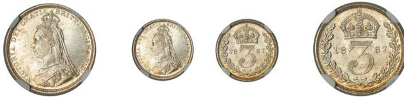
1341 Threepence, 1887 (ESC 3436; S 3931). Lustrous, mint state [Graded by NGC as MS 64]