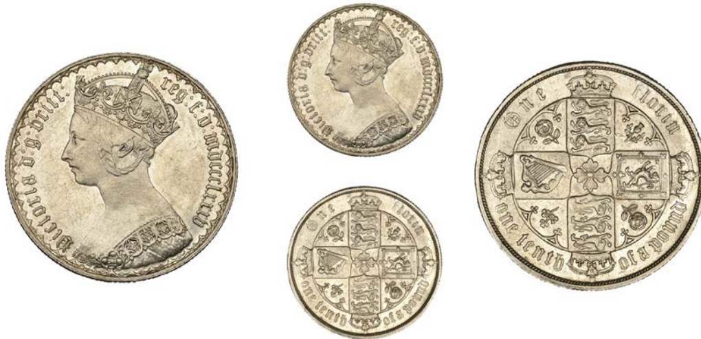
1326 Florin, 1885 (ESC 2909; S 3900). Virtually mint state, the obverse fields reflective with minimal hairlines