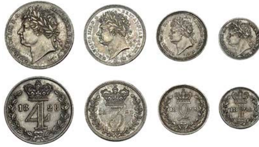
1304 Maundy set, 1828 (ESC 2453; S 3816) [4]. Good very fine or better, dark tone; in 19th century case