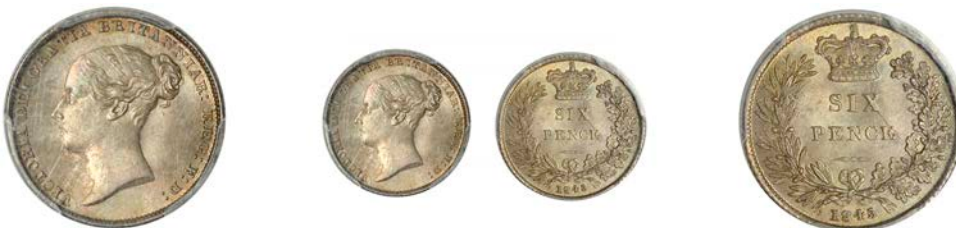
1337 Sixpence, 1845 (ESC 3179; S 3908). Lustrous, mint state [Graded by NGC as MS 67 TOP POP]