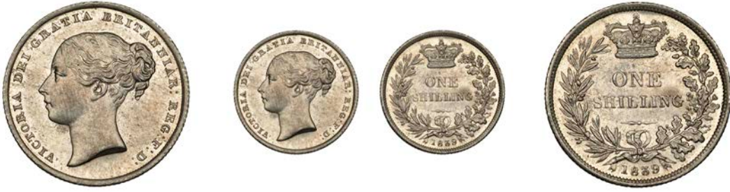
1328 Shilling, 1839, second young head (ESC 2979; S 3904). Minor obverse bagmarks, extremely fine