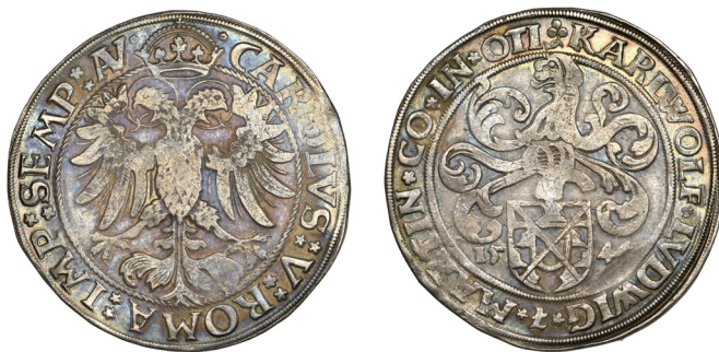
1432 ÖTTINGEN, Karl Wolfgang, Ludwig XV, and Martin, Thaler, 1544, 28.77g/2h (Dav. 9617; Schult. 2617). Attractive cabinet tone, about very fine, scarce £200-£260