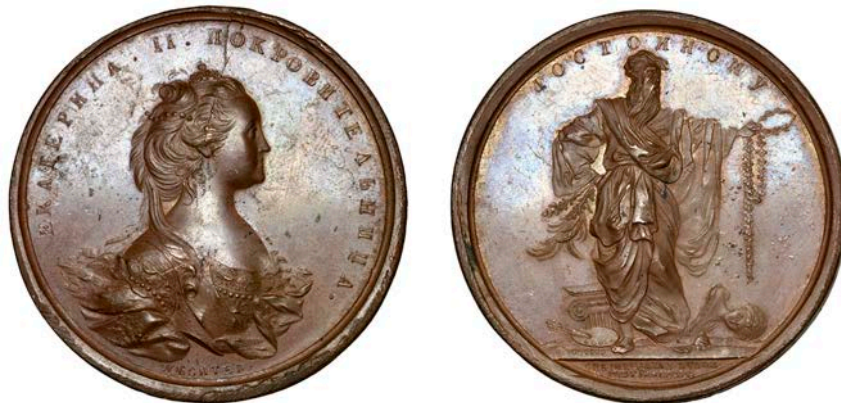
1584 St. Petersburg Imperial Academy of Art , 1785, a bronze Medal by G. C. Waechter and P. L. Vernier, crowned bust right, rev. figure dressed in robes holding out laurel wreath and palms, painting tools and sculpture on ground, 52mm, 69.85g (Diakov 129.4). Speckled toning, otherwise extremely fine [Graded by NGC as MS 63 BN] £120-£150