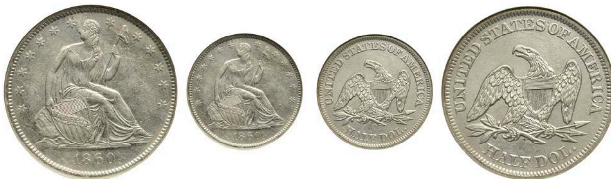
1499 Half-Dollar, 1860o, SS Republic (W-04; KM A68). Salt water damage, otherwise good very fine [Graded by NGC as SHIPWRECK EFFECT] £200-£300

The SS Republic (originally named the SS Tennessee) was a cargo steamship based in New Orleans for much of the 1850s. At the outbreak of the Civil War, she was seized by the Confederacy, though only saw a short service due to her recapture by the Union in April 1862. Used extensively thereafter as a gunboat, cargo ship, and troop carrier, she was returned to civilian service and renamed in March 1865. Not long after, however, the Republic was caught in a hurricane off the coast of Georgia. She sank with no loss of life, but was carrying over $400,000 worth of gold and silver coinage. Many of these coins were recovered in a 2003 excavation, including the example on offer.