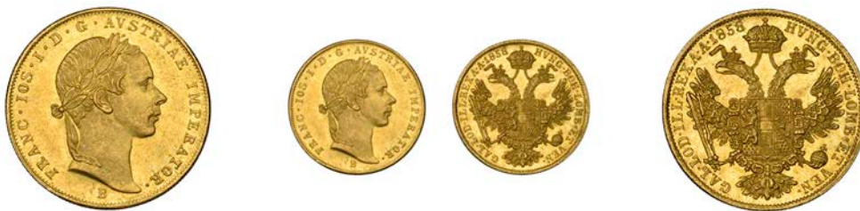
1406 Franz Joseph I, Ducat, 1858b, Kremnica (KM 2263). Lightly toned with some hairlines, extremely fine