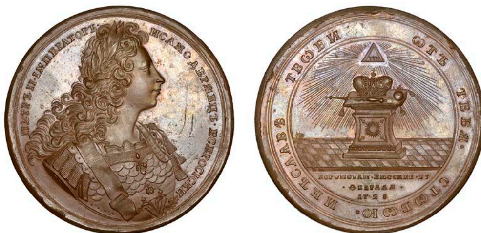
1571 Coronation of Peter II, 1728 , a large bronze Medal by O. Kalashnikov, armoured and laureate bust right, rev. Crown atop altar bearing cushion with orb and sceptre, radiate triangle with tetragrammaton above, 62mm, 96.48g (Diakov 66.4). Lightly toned with subdued prooflike fields, good extremely fine, rare [Graded by NGC as MS 64 BN] £200-£260