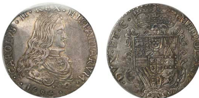
1476 MILAN, Charles II, Filippo , 1694, Milan (Dav. 4007; MIR 387.1; KM 92). Toned, good very fine and rare [Graded by PCGS as AU 55] £500-£600

Provenance: R. Erskine Collection [bt Seaby 1977]