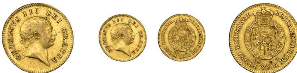
G 1255 Half-Guinea, 1804, seventh bust (EGC 849; S 3737). Fine