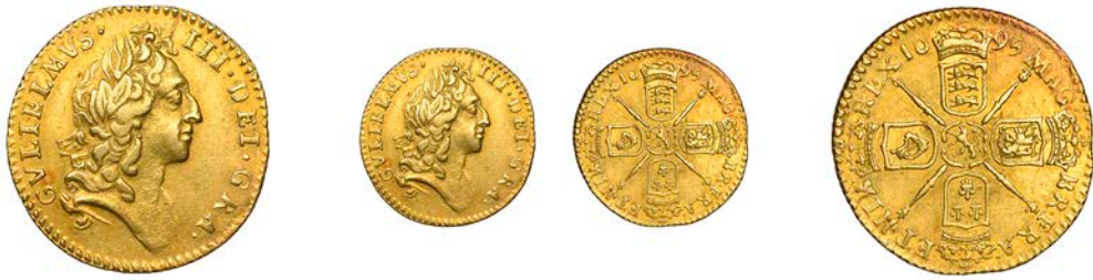
1216 Half-Guinea, 1695, early harp (EGC 429; S 3466). Some edge bruising, otherwise very fine, toned