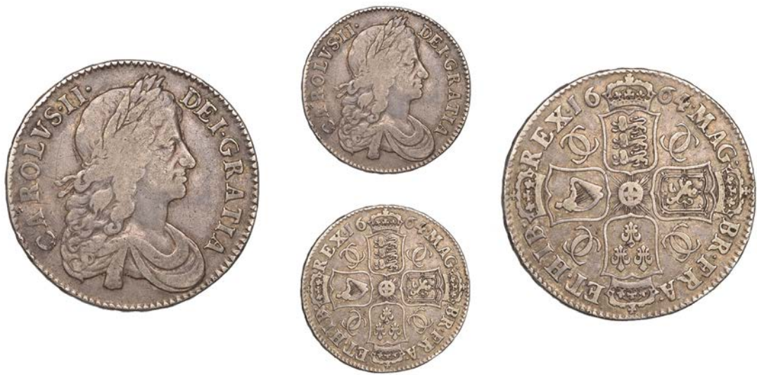
1209 Halfcrown, 1664, second bust, edge xvi (ESC 445; S 3362). Good fine, light marks, reverse better, rare