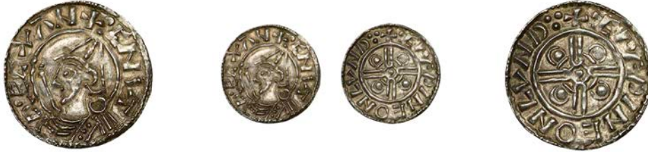
1065 Penny, Pointed Helmet type, London , Ælfwine, ÆLFWINE ON LVND, 0.98g/9h (BEH 1971 var. [b2]; N 787; S 1158). A trifle crimped, otherwise good very fine, toned £300-£360