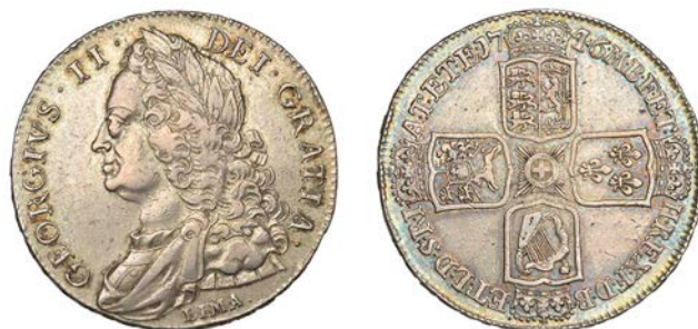
1242 Crown, 1746 LIMA, old head, edge DECIMO NONO (ESC 1668; S 3689). Very fine, toned