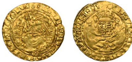
1126 Third Coinage, Half-Sovereign, Tower, mm. pellet-in-annulet, Roman lettering both sides, trefoil stops, 5.98g/10h (SCBI Schneider 612; N 1827; S 2294). Gilt, edge marks, good fine £700-£900