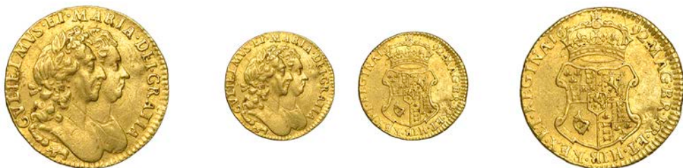
1211 Half-Guinea, 1692, elephant and castle below busts (MCE 166; S 3431). Small area of smoothing in field, very fine