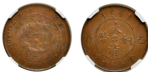
1422 Kwangtung, Xuantong, 10 Cash, yr 46 [1909], Kwangtung (KM Y.20). Toned with a pleasing chocolate brown patina, extremely fine [Graded by NGC as MS 62 BN] £100-£120