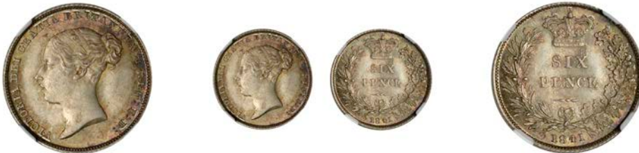
1335 Sixpence, 1841 (ESC 3174; S 3908). Beautifully toned and lustrous, practically as struck [Graded by NGC as MS 65]