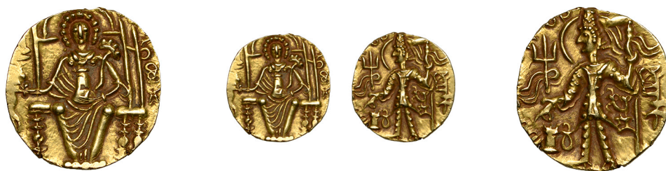
1459 KUSHAN, Kipunada, Dinar, AD 290-310, king standing facing, head to left, rev. Ardoksho enthroned, 7.86g/12h (Mitchiner 3548). Extremely fine, toned