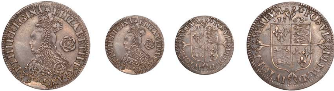
1139 Milled coinage, Sixpence, 1562, mm. star, bust C, tall bust, decorated dress, medium rose, 2.95g/6h (Borden/Brown 24, O1/R2; N 2026; S 2595). Obverse die break at 6 o'clock, nearly extremely fine and attractively toned £600-£800

Provenance: DNW Auction 154, 3 December 2018, lot 276; Covent Garden Collection