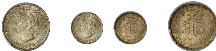
1420 Victoria, 25 Cents, 1893 (KM 95). Prettily toned, mint state [Graded by NGC as MS 65]