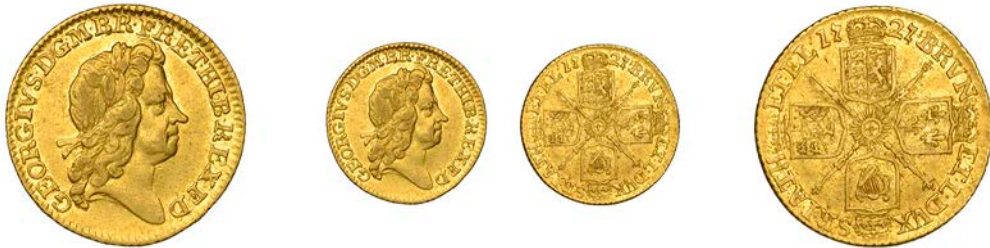
1229 Half-Guinea, 1727, second bust (MCE 276; EGC 548; S 3637). Lightly cleaned, about good very fine, scarce £400-£500 Provenance: G. Lawrence Collection