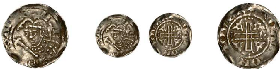
1088 Penny, Voided Cross and Stars type [BMC II], Dover , Adam, +ADAM : ON : DOVER, 1.37g/9h (Mack 57y; SCBI —; N878; S 1280). A trifle crimped, otherwise very fine and toned, with an excellent portrait; the mint extremely rare in Stephen's reign £600-£800