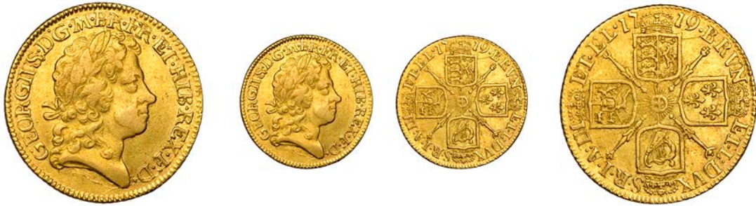
1228 Guinea, 1719, fourth bust (MCE 251; S 3631). Very fine, scarce £800-£1,000 Provenance: G. Lawrence Collection