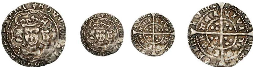
1120 Light coinage, Groat, York, class VIIIb (?), mm. lis on obv. only, no ε on breast, quatrefoils by neck, 2.34g/2h (cf. B & W VIII; N 1583; S 2013). Possibly a contemporary forgery or an issue from locally made dies, very fine and toned, very rare £150-£200

Provenance: J. Atkinson Collection, DNW Auction 147, 12-14 June 2018, lot 220