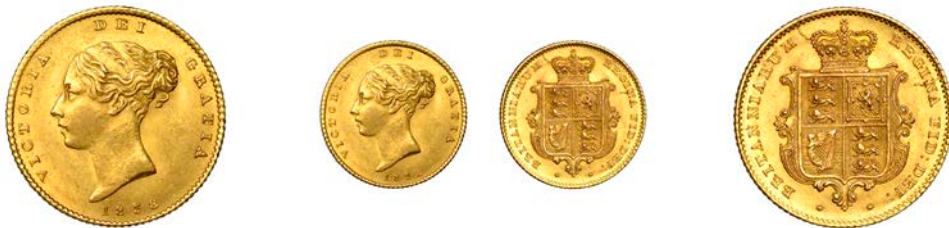
G 1315 Half-Sovereign, 1838 (Hill 414; S 3859). A pleasing example, extremely fine, scarce Provenance: G. Lawrence Collection