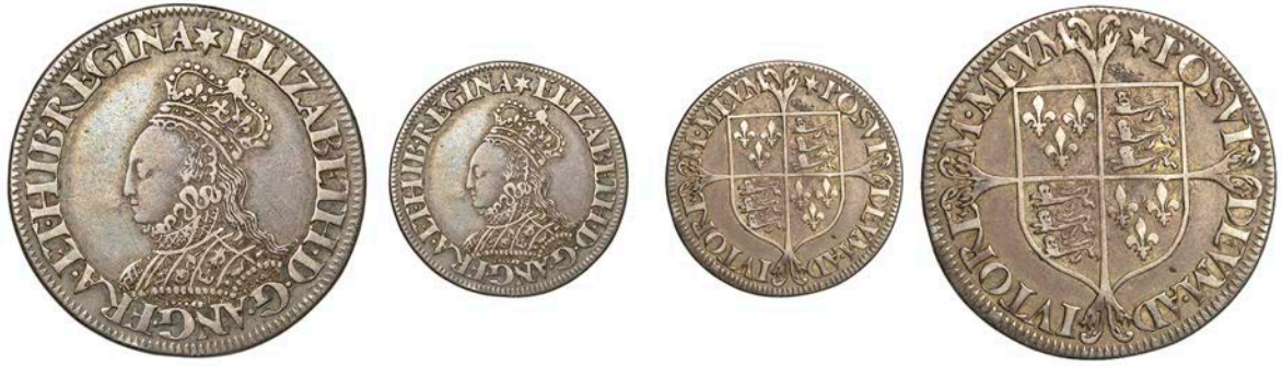
1134 Milled coinage, Shilling, mm. star, small size, bust A, decorated dress, 5.90g/6h (Borden/Brown 17, O1/R1; Wilkinson 495, same dies; N 2023; S 2592). A few minor marks and scratches in obverse fields, about very fine, toned £400-£500