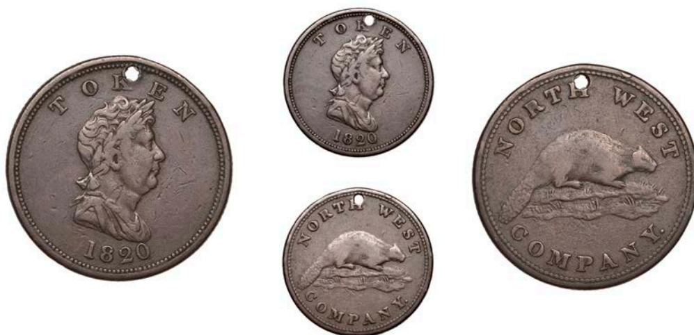
1416 North West Company , copper Token, 1820, bust of George IV right, TOKEN above, date below, rev. beaver centre with inscription NORTH WEST COMPANY above and below, edge grained, 10.24g (Br. 925; FT. 10B). Customary piercing at 12 o'clock, toned with brown patina, some scuffs, otherwise very fine and extremely rare [slabbed NGC VF 35 BN] £5,000-£6,000

Only two other specimens believed known, one in the Bank of Canada Museum in Ottawa, the other, in far inferior condition, dispersed in trade in 2016