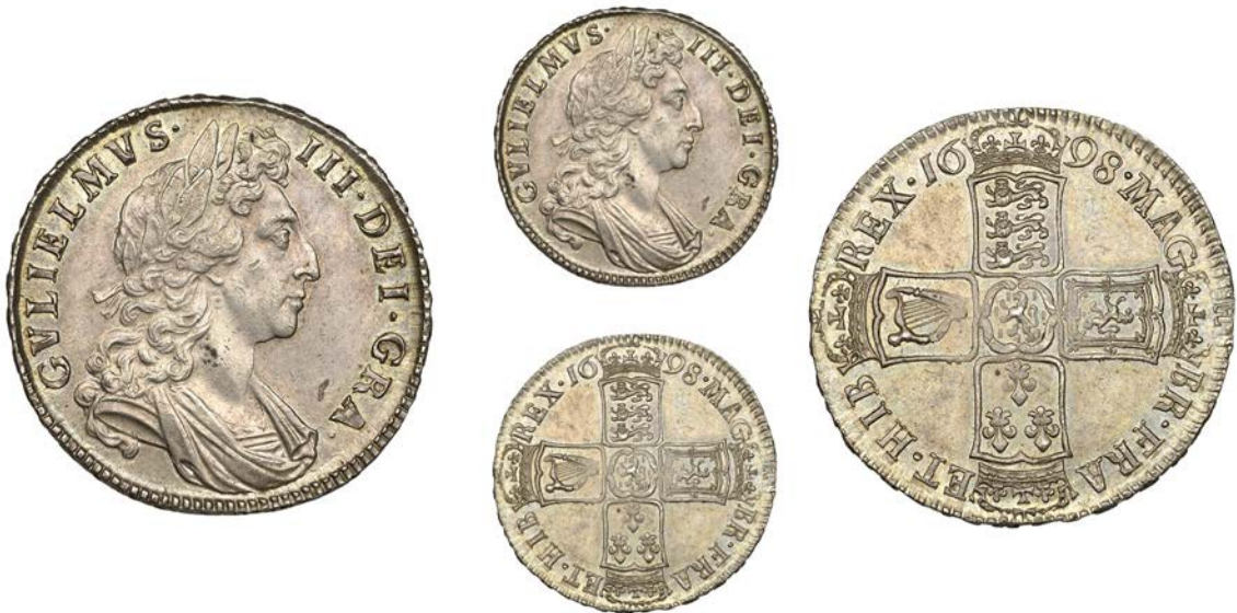
1217 Halfcrown, 1698, edge DECIMO (ESC 1034; S 3494). Lustrous with an attractive cabinet tone, about extremely fine [Graded by NGC as AU58]