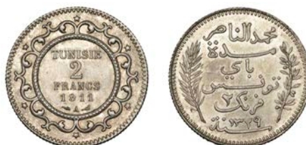
1493 Muhammad V, Two Francs, AH 1329 [1911], mm. Henri-Auguste-Jules Patey, Paris (KM 239). A pleasing light hue on reverse, mint state and lustrous, rare thus [Graded by NGC as MS 64] £100-£120