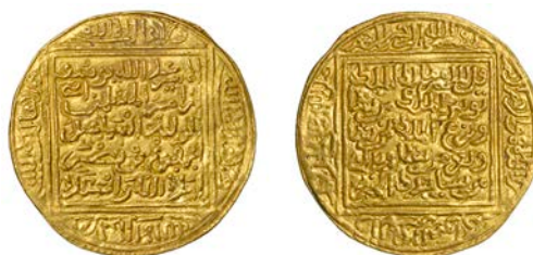
1511 Yusuf I (734-755h), Dinar, no mint or date, 4.65g/12h (A 410; Medina Gómez 243). Nearly extremely fine