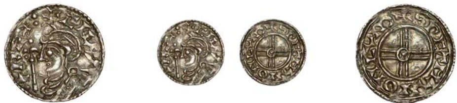
1069 Penny, Short Cross type, London , Swetman, SPETMAN ON LVND, 0.94g/3h (BEH —; SCBI Copenhagen 2941, same dies; N 790; S 1159). Dark glossy tone with some deposits, very fine; this moneyer extremely rare under Cnut £200-£260

Provenance: Glendings Auction, 25 June 1997, Lot 104