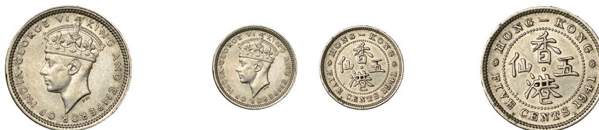
1444 George VI, 5 Cents, 1941 KN (Prid. 162; KM. 22). Extremely fine and extremely rare [slabbed NGC AU55]