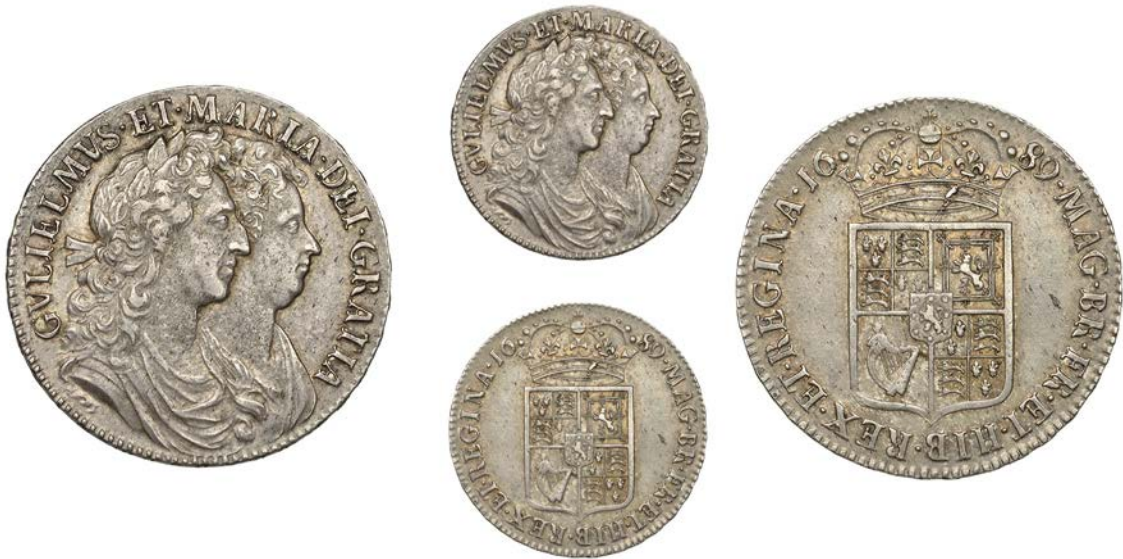
1213 Halfcrown, 1689, second shield, no frosting, with pearls, edge PRIMO (ESC 845; S 3435). Lightly toned, good very fine [Graded by NGC as AU55] £600-£800

The second highest graded example at NGC or PCGS - just one example higher.