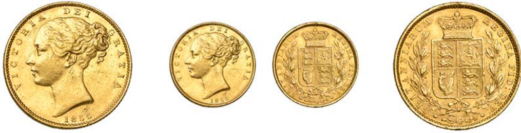
G 1313 Sovereign, 1855, ww incuse (Hill 38; Bull 1117; S 3852D). Obverse brushed, otherwise very fine Provenance: G. Lawrence Collection