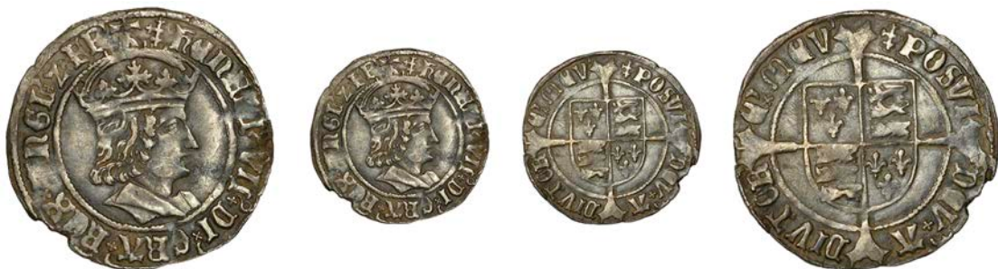
1124 Profile issue, Groat, tentative type, mm. cross-crosslet, reads V · I · I and AGL Z F', saltire stops, 2.98g/12h (SCBI Ashmolean 778-785; N 1743; S 2254). Small edge chip and with patchy patina, otherwise very fine £400-£500