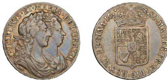
1214 Halfcrown, 1689, second shield, caul only frosted, pearls, edge PRIMO (ESC 839; S 3435). Nearly very fine, attractively toned £200-£260

The second highest graded example at NGC or PCGS - just one example higher.