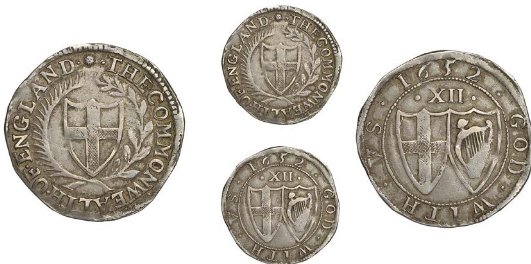
1200 Shilling, 1652, mm. sun on obv. only, 6.01g/6h (ESC 103; N 2724; S 3217). Struck on a full flan, about very fine and toned £240-£300 Provenance: R. Erskine Collection