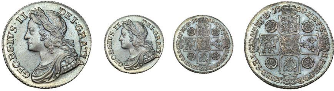
1243 Shilling, 1739, roses (ESC 1716; S 3701). Attractively toned, extremely fine