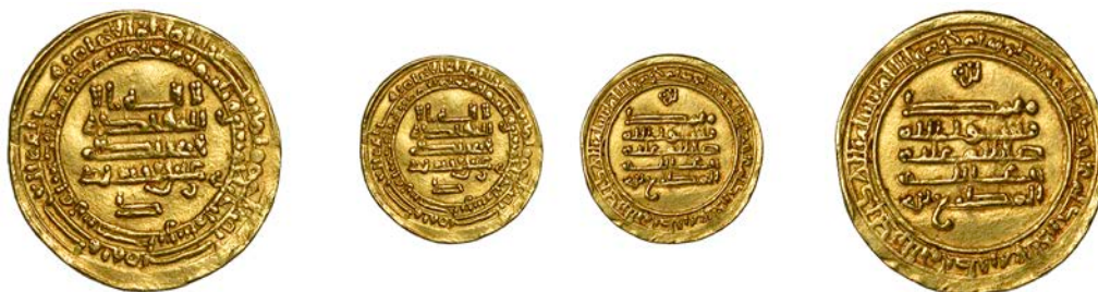
1514 Ali b. al-Ikhshid , Dinar, Filastin, 351h, with kaf in lower rev. field for the Chamberlain Kafur, 5.55g/1h (Bacharach 97; A 678). Good very fine