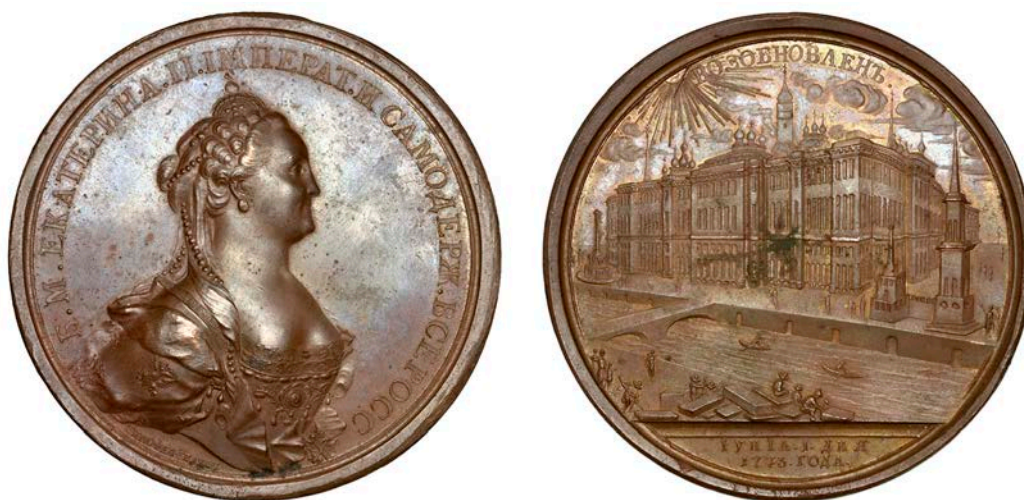
1579 Restoration of the Kremlin Palace , 1773, a bronze Medal by T. Ivanov, crown and mantled bust right, rev. view of the Kremlin on the banks of the Moscow River, workers in foreground, 65mm, 109.13g (Diakov 163.1). Some rubbing on shoulder with verdigris, otherwise extremely fine [Graded by NGC as MS 62 BN]