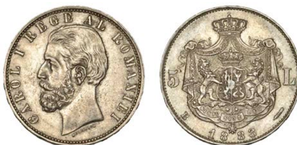
1491 Carol I, 5 Lei, 1883b, Bucharest (Dav. 274; KM 17). Toned with some bagmarks, otherwise good very fine, rare [Graded by NGC as AU 58] £200-£300

The single highest graded example at either NGC or PCGS. A must-have for Romanian collectors.