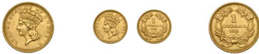
1495 Dollar, 1862, Indian Head, Philadelphia (KM 86). Good very fine