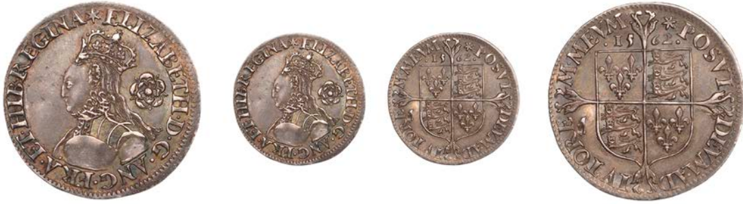
1138 Milled coinage, Sixpence, 1562, mm. star, bust B, tall narrow bust, plain dress, medium rose, 3.09g/6h (Borden/Brown 23, O2/R2; N 2025/2; S 2594). Usual die flaw in reverse field, otherwise nearly extremely fine with attractive cabinet tone £500-£700

Provenance: DNW Auction 154, 3 December 2018, lot 276; Covent Garden Collection