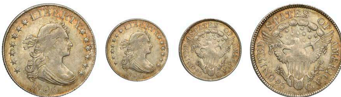
1500 Quarter-Dollar, 1806, Philadelphia (KM 36). Slightly weak in centre of reverse, otherwise about extremely fine with light peripheral toning [Graded by NGC as MS 62] £2,000-£3,000

The SS Republic (originally named the SS Tennessee) was a cargo steamship based in New Orleans for much of the 1850s. At the outbreak of the Civil War, she was seized by the Confederacy, though only saw a short service due to her recapture by the Union in April 1862. Used extensively thereafter as a gunboat, cargo ship, and troop carrier, she was returned to civilian service and renamed in March 1865. Not long after, however, the Republic was caught in a hurricane off the coast of Georgia. She sank with no loss of life, but was carrying over $400,000 worth of gold and silver coinage. Many of these coins were recovered in a 2003 excavation, including the example on offer.