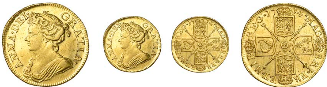
1221 Guinea, 1714, third bust (EGC 479; S 3574). Cleaned, otherwise very fine