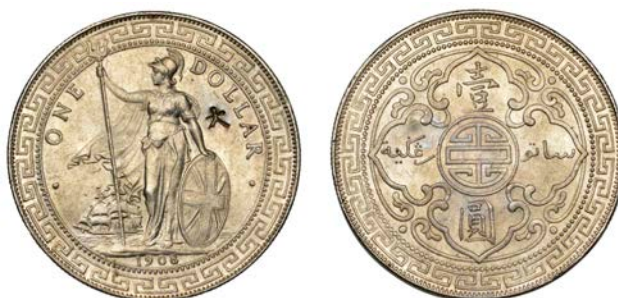
1413 Trade Dollar , 1908v, Chinese countermark [da] on obv., Bombay (Prid. 18; KM T5). Lustrous, extremely fine, scarce £100-£120