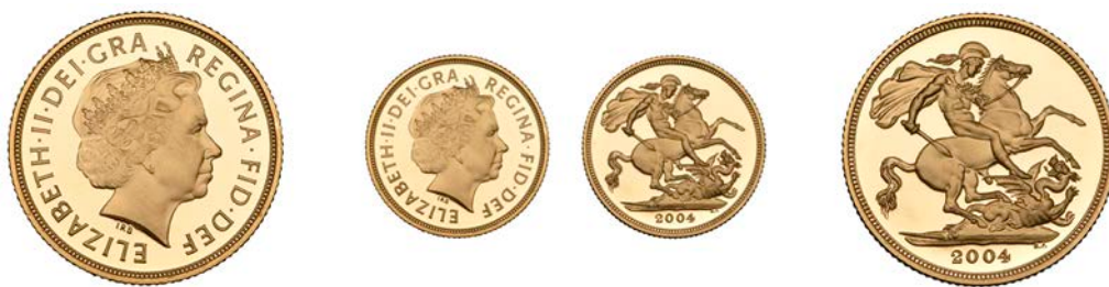
G 1363 Proof Sovereign, 2004 (Hill 320; S SC4). As struck Provenance: A. Mint Collection