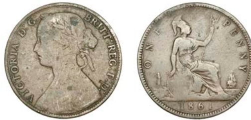
1347 Penny, 1861, dies 4+F, full top leaf variant (Gouby BP 1861 E; F 24; S 3954). Fair, extremely rare £600-£800