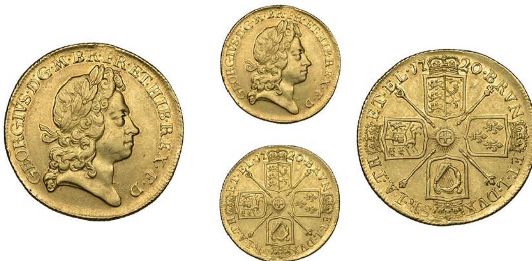
1226 Two-Guineas, 1720/17 (MCE 243; Bull 500; S 3627). Lightly cleaned, nicks by edge at 12 and 9 o'clock, about very fine £2,000-£3,000 Provenance: A. Mint Collection