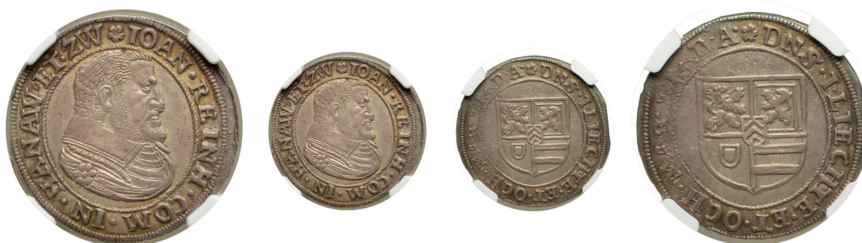
1434 HANAU-LICHTENBERG, Johann Reinhard I, Teston, c. 1614-18, Woerth, 7.88g/12h (KM 6). Sharply struck with a bold portrait, almost extremely fine for type, rare [Graded by NGC as AU 58] £300-£400