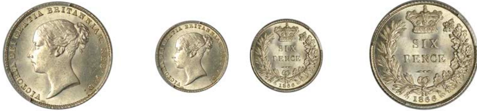
1339 Sixpence, 1866, die 24 (ESC 3213; S 3909). Lustrous, mint state [Graded by NGC as MS 65]