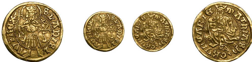
1451 Matthias Corvinus , Forint or Goldgulden, c. 1482-89, mm. n and swan in shield, Nagybanya mint, 3.50g/6h (Lengyel 45/8; Huszar 680; ÉH 540). Toned, very fine £600-£800