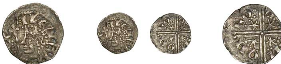
1382 First coinage, Sterling, type III, Roxburgh , Adam, AD AM ON RO, 1.35g/2h (cf. SCBI 35, 133; B 23, fig. 121; S 5043). Off centre, about very fine, dark patina with a little roughness £200-£240