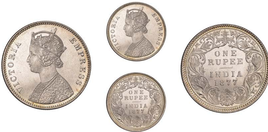
1470 Victoria, silver Rupee, 1877, type A1/I, Calcutta, crowned and robed bust left, VICTORIA EMPRESS, 3.75 panels in jabot, v on bodice, crescent at point of shoulder, rev. ONE RUPEE above INDIA and date, all within scroll-like wreath of Indian flora, top flower with curved spikes, leaf arrangement at lower left with five leaves, edge grained, 11.63g/12h (Prid. 115 [Sale, lot 123]; SW 6.29; KM. 492; cf. Fore III, 2390). Minor bagmarks in obverse field, otherwise virtually as struck, full mint bloom, attractive [Graded by NGC as MS 64] £200-£260