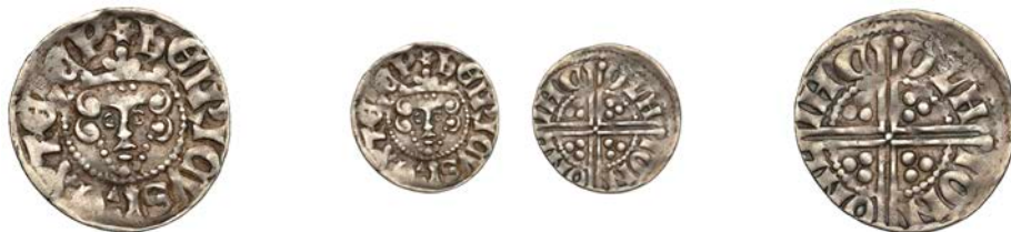
1095 Long Cross coinage, Penny, class IIb, Lincoln , Ion, ION ON LINCOLN, 1.45g/4h (N 985/1; S 1361A). Toned, very fine £100-£120