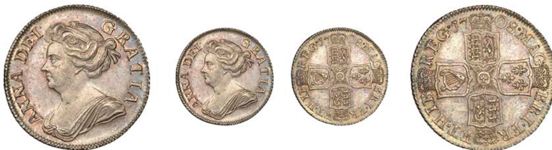
1224 Shilling, 1708, third bust, plain angles (ESC 1399; S 3610). Attractive cabinet tone, good extremely fine [Graded by NGC as MS 63] £240-£300