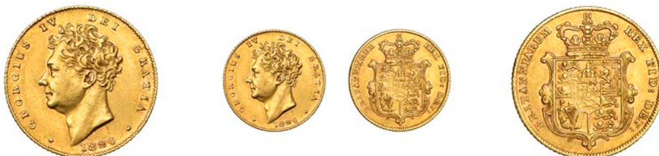
G 1298 Half-Sovereign, 1826 (M 407B; S 3804A). Once cleaned but since toned, good fine