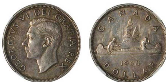
1418 George VI , Dollar, 1948 (KM. 46). Good very fine, toned and rare [Graded NGC AU 55] £800-£1,000