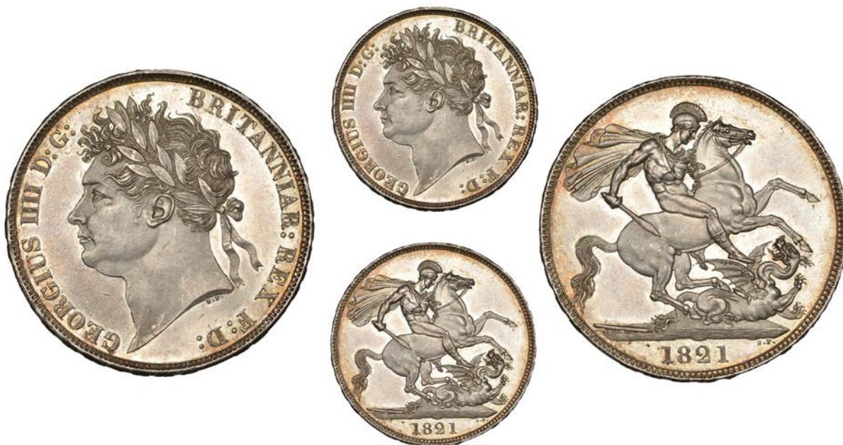
1299 Crown, 1821, edge SECUNDO (ESC 2310; S 3805). Good extremely fine, with bright reflective fields [Graded by NGC as MS 63]