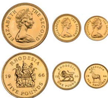
1489 Elizabeth II, Proof Set, 1966, comprising Five Pounds, Pound, and 10 Shillings (KM PS3) [3]. Good extremely fine; in original black case of issue £3,000-£3,600