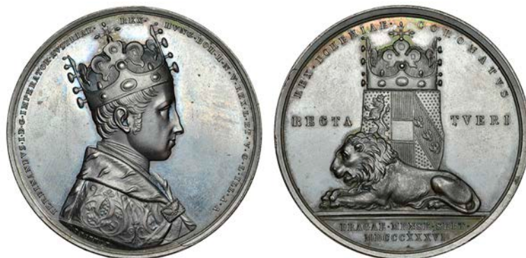
1590 AUSTRIA, Bohemian Coronation of Ferdinand I, 1836 , a bronze medal by Böhm, crowned bust right, rev. seated lion by Bohemian arms, 46mm, 75.38g (Mont. 1555). Lightly toned, practically as struck £100-£120