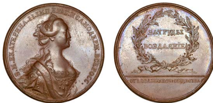
1578 Liberal Economy Society of Russia , undated, a bronze Medal by T. Ivanov, crown and mantled bust right, rev. inscription across two lines within laurel wreath, 44mm, 27.10g (Diakov 142.9). Some scuffs on obverse, otherwise good extremely fine [Graded by NGC as MS 62 BN]