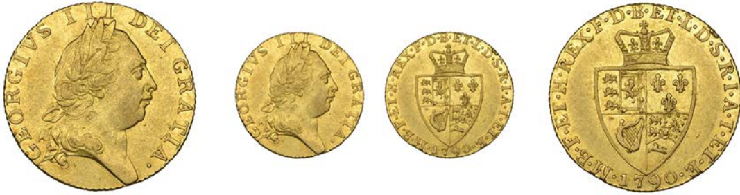
1248 Guinea, 1790, fifth bust (EGC 718; S 3729). Cleaned, otherwise good very fine; accompanied by Royal Mint presentation box and Certificate of Authenticity £500-£600