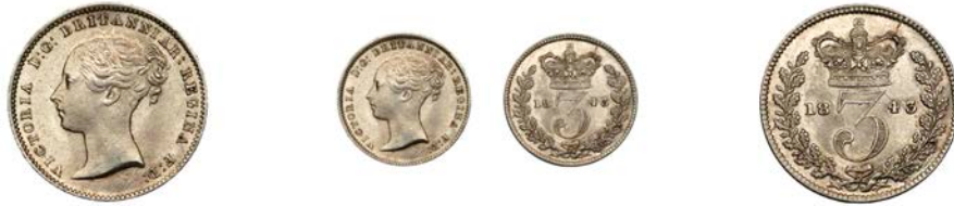
1340 Threepence, 1843 (ESC 3369; S 3914) A few light marks, otherwise better than extremely fine