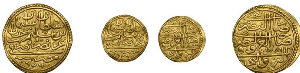
1520 Suleyman I, Sultani, Misr 926h, 3.45g/3h (Album 1317; ICV 3158). About very fine