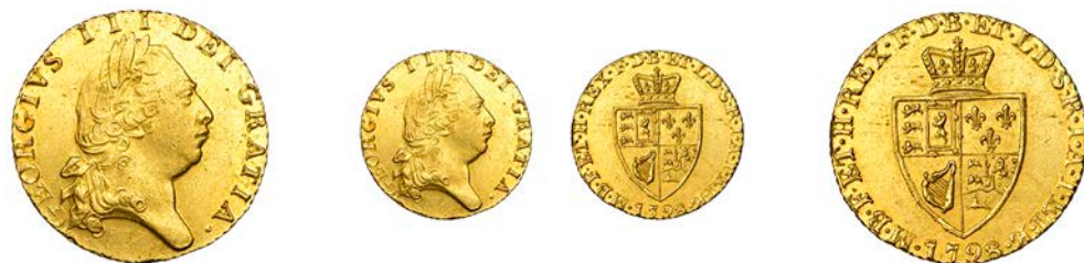
1252 Half-Guinea, 1798 (EGC 842; S 3735). Lustrous, good very fine £240-£300 Provenance: G. Lawrence Collection