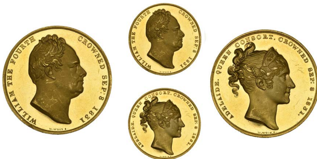
1550 Coronation of William IV and Queen Adelaide, 1831 , a gold medal by W. Wyon, bust right, rev. bust of Queen Adelaide right, 33mm, 26.74g (BHM 1475; E 1251). Some light scuffs and hairlines, edge marks at 3 and 9 o'clock, otherwise lightly toned with deep reflective fields, nearly extremely fine and rare £3,000-£4,000