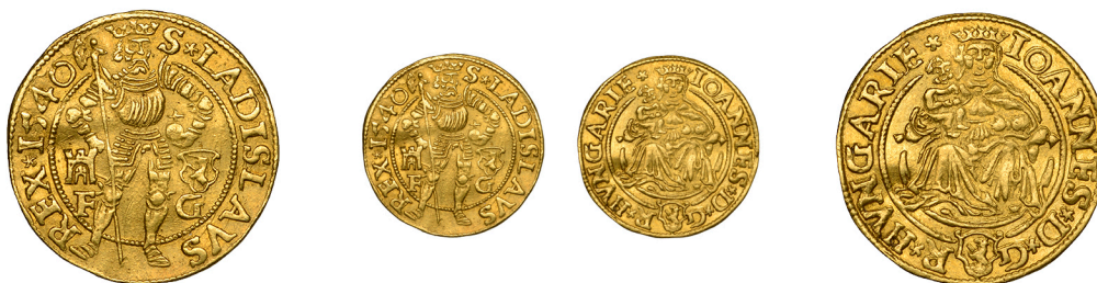
1453 Johann Zapolya , Forint or Goldgulden, 1540FG, Klausenburg mint, 3.54g/6h (Lengyel 157/1/1540; ÉH 691b; Huszar 871). Small edge nicks, otherwise good very fine £1,000-£1,200