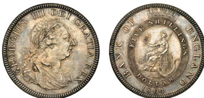
1274 Dollar , 1804, types E/2 (ESC 1951; S 3768). Pleasing cabinet tone, extremely fine [Graded by NGC as MS61] £200-£260