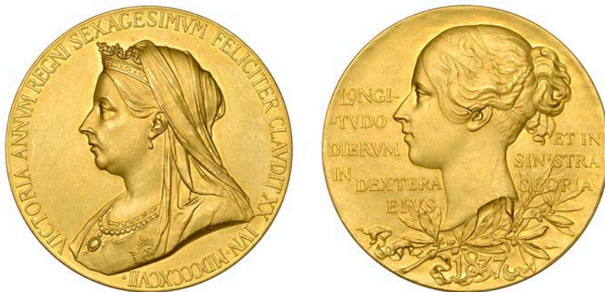
1560 Victoria, Diamond Jubilee, 1897 , a large gold medal by G.W. de Saulles, veiled bust left, rev. young head left, 55mm, 94.37g (W & E 3000A.5; BHM 3506; E 1817a). Small nick to left of ear on reverse, otherwise good extremely fine [Graded by NGC as MS 62]; sold with fitted red case of issue £6,000-£8,000