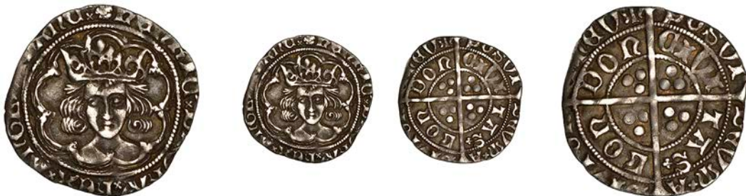
1123 Facing Bust issue, Groat, class la/lb mule, mm. dimidiated lis-rose on obv. only, no marks by neck, quatrefoil after DEVN and TAS, 2.83g/4h (SCBI Ashmolean 109; N 1703; S 2193). A little clipped, about very fine, rare £200-£260