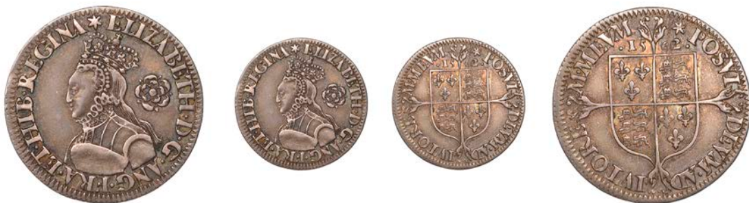
1137 Milled coinage, Sixpence, 1562, mm. star, bust B, tall narrow bust, plain dress, medium rose, 3.14g/6h (Borden/Brown 23, O6/R6; N 2025/2; S 2594). Very fine or better attractively toned £400-£500

Provenance: Davissons Mailbid Sale 38, February 2019 (110); Covent Garden Collection