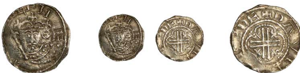
1089 Penny, Cross Pommée type [BMC VII], Bedford , David, DAVI[—]BEDE, 1.18g/9h (Mack 100a; N 881; S 1282). A little striking weakness and a few trifling stress marks, otherwise about very fine, rare thus £600-£800

Provenance: Found near Thetford in 2023 (EMC 2024.0446)