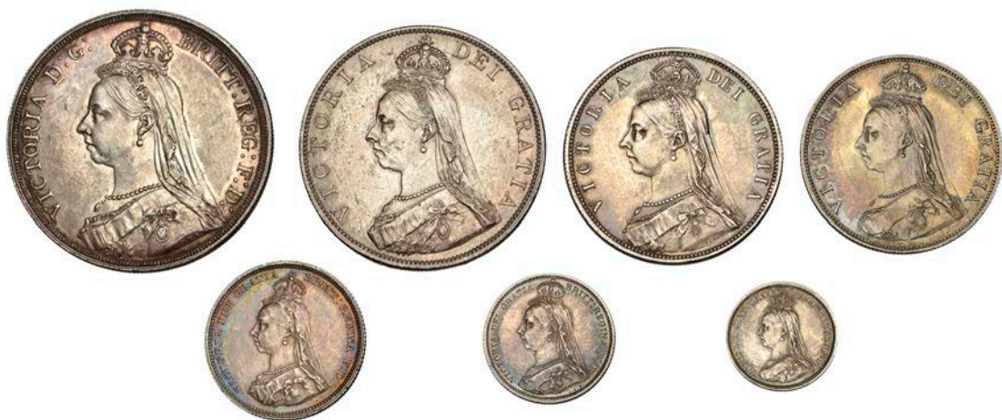
1352 Currency set, 1887, comprising Crown to Threepence (S 3921-2, 3924-6, 3928, 3931) [7]. Some tarnishing and light cleaning, generally extremely fine or about so £200-£300