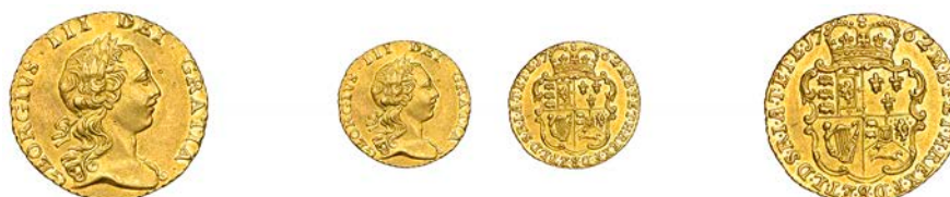
1258 Quarter-Guinea, 1762 (EGC 886; S 3741). Scratches in reverse fields, otherwise good very fine