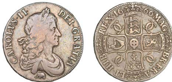
1208 Crown, 1666, second bust with elephant below, edge ANNO REGNI XVIII (ESC 368; S 3356). Fine, toned, rare