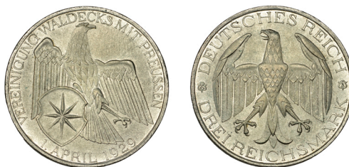
1439 WEIMAR REPUBLIC, 3 Reichsmark, 1929A, Vereinigung Waldeck, Berlin (KM 62; J 337). An excellent example, only lightly toned, mint state £100-£120