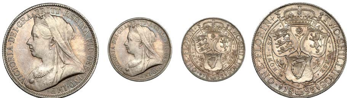
1327 Florin, 1893 (ESC 2962; S 3939). Good extremely fine, attractively toned