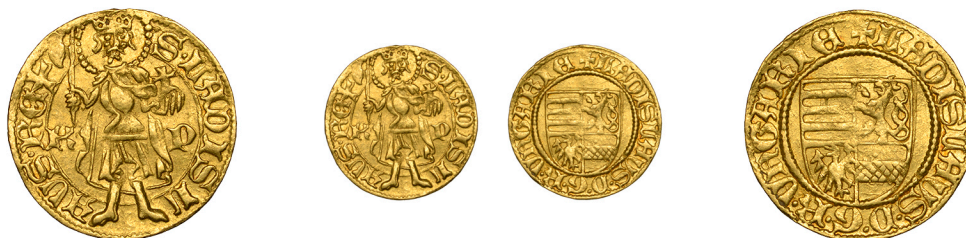
1449 Ladislav V (1453-7), Forint or Goldgulden, c. 1453-57, mm. κ and ρ, Kremnitz mint, 3.49g/1h (Lengyel 29/2; ÉH 515b; Huszár 636). Good very fine, edge mark at 12 o'clock £700-£900