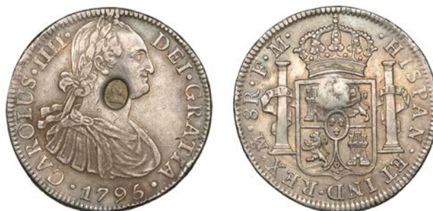
1272 MEXICO, Charles IV , 8 Reales, 1795 FM , Mexico City, obv. countermarked with head of George III in oval, 26.81g/12h (ESC 1852; S 3765A). Toned, very fine, countermark better £200-£260