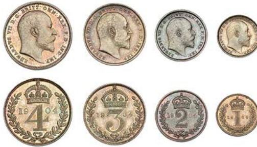
1356 Maundy Set, 1904 (ESC 3610; S 3985) [4]. Virtually mint state with matching tone; in dated case of issue