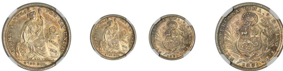
1488 1/5 Sol, 1891 \tau\epsilon , Lima (KM 205.1). Attractively toned with underlying lustre, extremely fine; a key date in the series, rare [Graded by NGC as MS 63] £120-£150