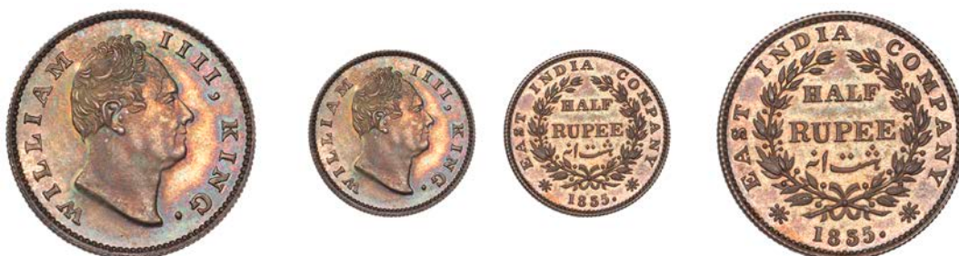
1466 EIC, William IV, early restrike Proof Half-Rupee, 1835 [1836-40], type C/III, Calcutta, f raised on truncation, laurel wreath with 19 berries, 12h (SW 1.59; KM. 449.2). Brilliant mint state, fully reflective surfaces, attractively toned, rare [Graded by NGC PF 64]