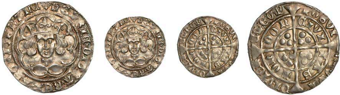
1117 Leaf-Pellet issue, Groat, London, class B, mm. cross IIIb on obv. only, fleur on breast, pellets by crown, reads ANGLI, rev. pellet on inner circle in second and third quarters, 3.88g/8h (Whitton 46e; N 1504; S 1915). Reverse pellets indistinct, otherwise good very fine, scarce £200-£260

Provenance: DNW Auction 102, 18 September 2012, lot 2456