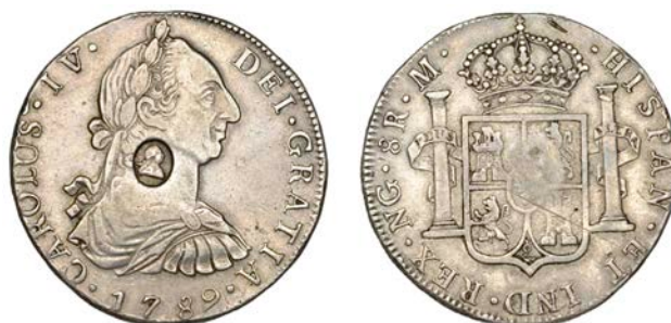
1268 GUATEMALA, Charles IV , 8 Reales, 1789 NG , Nueva Granada, obv. countermarked with head of George III in oval, 26.70g/12h (ESC 1854; 3765A). Light scratch across lower right of reverse, otherwise very fine or better, very rare £800-£1,000