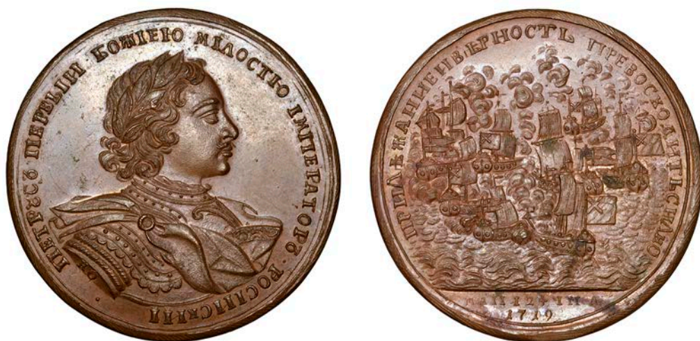
1568 Capture of Three Swedish Frigates, 1719 , a bronze Medal by O. Kalashnikov, laureate, draped and armoured bust right, rev. clustered view of the Battle of Ösel Island, 44mm, 47.39g (Diakov 55.5). Some deposits on reverse, otherwise good extremely fine, rare [Graded by NGC as MS 64 BN] £200-£260

Based on the eponymous painting by Maurice Baquoy.