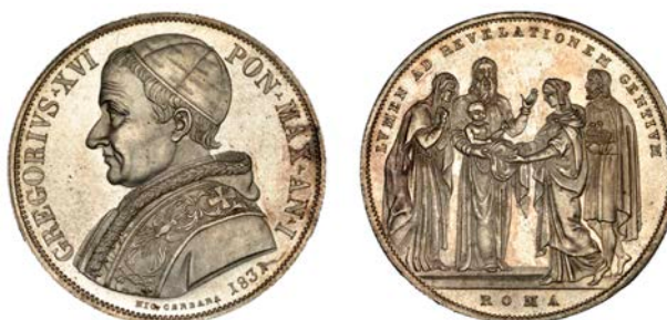
1485 Gregroy XVI , Scudo, 1831r, Light and Revelations to the Gentiles, type 1, Rome (Dav. 191; MIR 3093; KM 1315). Lightly toned, otherwise with full mint bloom, mint state and very rare thus [Graded by NGC as MS 65] £200-£300