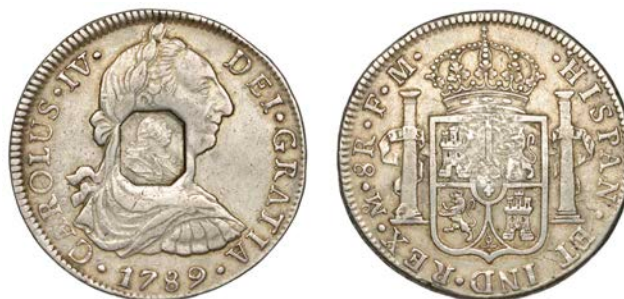
1269 MEXICO, Charles IV , 8 Reales, 1789 FM , Mexico City, obv. countermarked with head of George III in octagon, 26.89g/12h (ESC 1868; S 3766). Toned, very fine or better, scarce £300-£400

Provenance: The Swiss Bank Corporation, Auction 69, 23 January 2007, Lot 2759