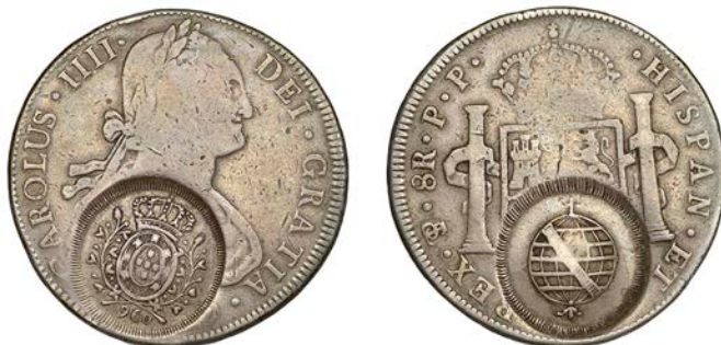
1411 Minas Gerais , 960 Réis, undated [1808], on Bolivia, Charles IV , 8 Reales, 1800pp, Potosí, countermarked with crowned arms within wreath in circular indent, rev. countermarked with globe in circular indent (KM 242; LMB 450). Countermark about very fine and clearly struck, host coin toned and fine £150-£200

Provenance: A. Patterson Collection, Bonhams Auction, 16-17 July 1996, lot 535; R. Erskine Collection