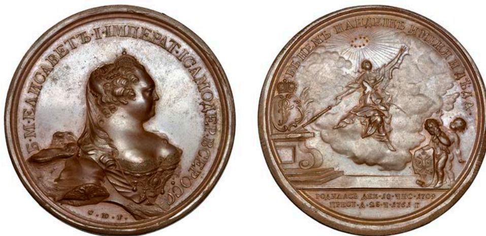
1577 Death of Empress Elizabeth I , 1761, a bronze Medal by S. Yudin, crowned, mantled and draped bust right, rev. spirit of Elizabeth ascending to heaven, resting sceptre on pedestal with initials of new Tsar (Peter III), two weeping infants supporting Russian Arms, 60mm, 91.99g (Diakov 107.1). Lightly toned, good extremely fine, rare [Graded by NGC as MS 64 BN] £150-£200