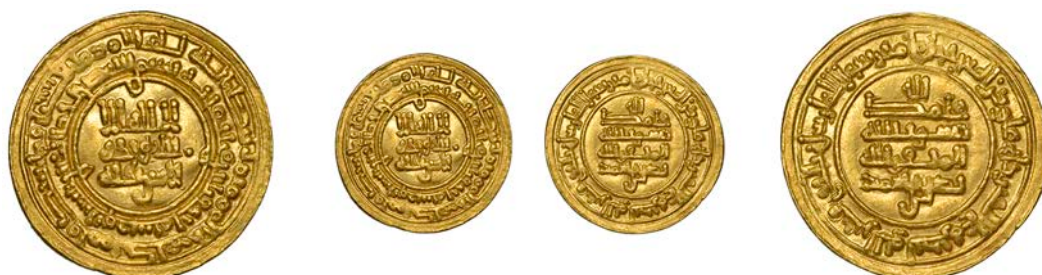
1522 Nasr II b. Ahmad, Dinar, Nishapur, 331h, 5.17g/1h (A 1449; Bernardi 269Pi). On a broad heavy flan, good very fine or better