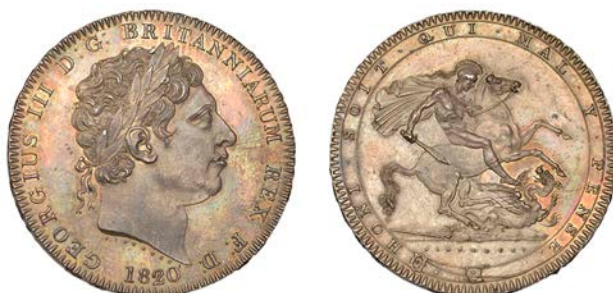
1290 Crown, 1820 [over 19?], edge lx (cf. ESC 2018; S 3787). Good extremely fine, artificially toned [Graded NGC as UNC Details, Obv. Stained]

Provenance: Bt Grantham Coins, 29 August 1997