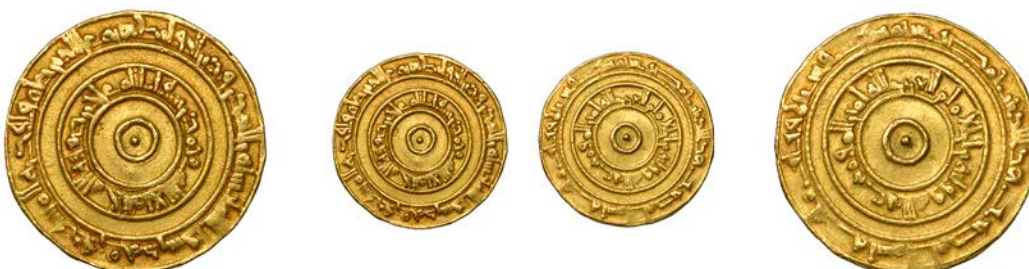
1517 al-'Aziz Nizar , Dinar, Misr, 366h, 4.15g (A 703; Nicol 700). Very fine or better

Provenance: Baldwin FPL February 2014 (2456)