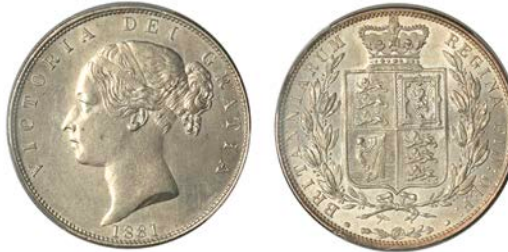
1324 Halfcrown, 1881 (ESC 2758; S 3889). Residual lustre, almost extremely fine [Graded by PCGS as AU 58]