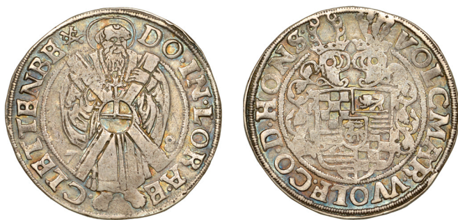
1433 HOHNSTEIN, Volkmar Wolfgang, Thaler, 1578, Ellrich, 28.72g/6h (Dav. 9316; Schulten 164). Prettyly toned, good fine and rare £300-£400