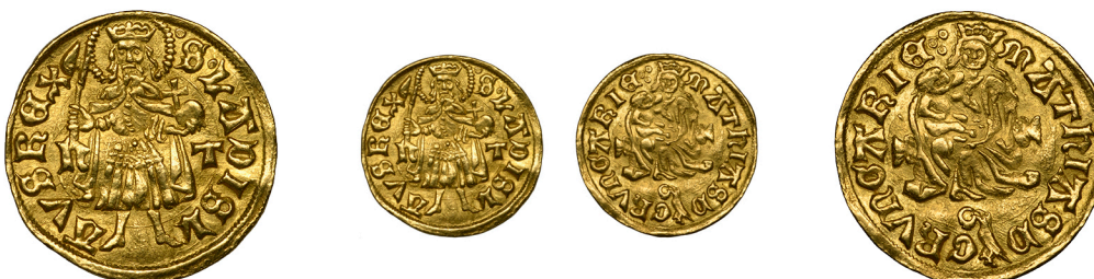
1450 Matthias Corvinus (1458-90), Forint or Goldgulden, c. 1482-89, mm. ητ, Nagybanya mint, 3.53g/2h (Lengyel 45/14B; ÉH 540a; Huszár 680). Good very fine £600-£800