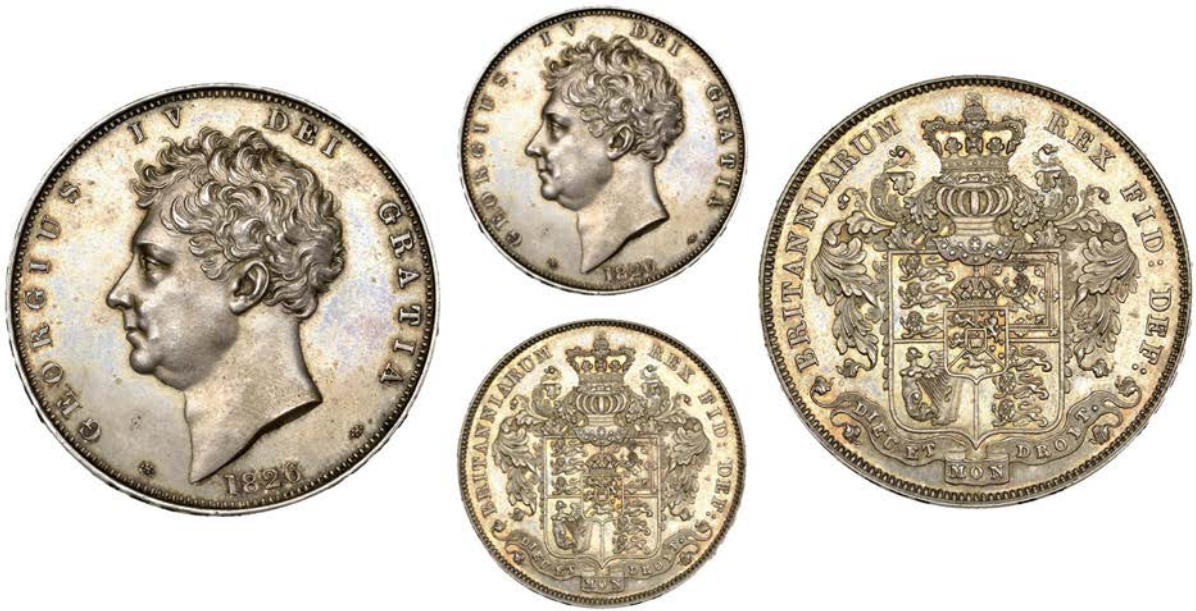
1300 Proof Crown, 1826, edge SEPTIMO (L & S 28; ESC 2336; S 3806). Even dark cabinet tone with some underlying brilliance, light hairlines in obverse field otherwise extremely fine [Graded by NGC PF 62] £6,000-£8,000