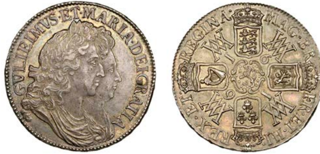
1212 Crown, 1691, edge TERTIO (ESC 820; S 3433). A pleasing example with an even grey patina, about extremely fine [Graded by NGC as AU58] £3,000-£3,600