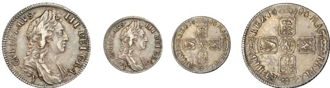
1218 Shilling, 1696y, first bust, capital Y (ESC 1189; S 3503). Darkly toned, very fine or better, scarce