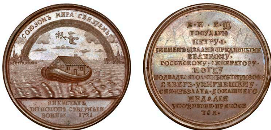
1569 Peace of Nystadt, 1721 , a bronze Medal, unsigned, Noah's Ark at sea, dove flying left above with an olive branch in beak, rainbow connecting cities of St. Petersburg and Stockholm, rev. inscription across 13 lines, 60mm, 91.73g (Diakov 57.2). Pencil marks to upper half of reverse, otherwise good extremely fine [Graded by NGC as MS 62 BN] £120-£150