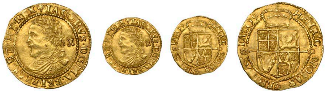
1154 Third coinage, Half-Laurel, mm. trefoil [1624], fourth bust, 4.62g/3h (SCBI Schneider 92; N 2117; S 2641a). Scratch in upper right quadrant of reverse, otherwise good very fine £900-£1,200