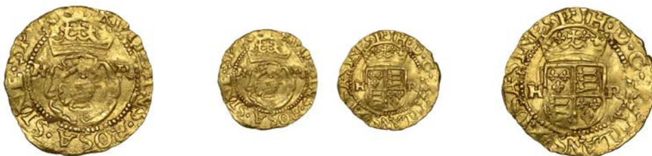
1129 Posthumous issue, Halfcrown, mm. arrow, RUTILANS ROSA SINE SPINA around crowned rose, H-R in fields, rev. H . D . G . R V T I L A N S R O S E S I N E S P around crowned shield of arms, H-R in fields, 1.48g/9h (SCBI Schneider –; Stewartby p. 523 (iv); N 1869; S 2399). A trifle creased with minute edge split, otherwise good fine and clear, an extremely rare variety £1,000-£1,500