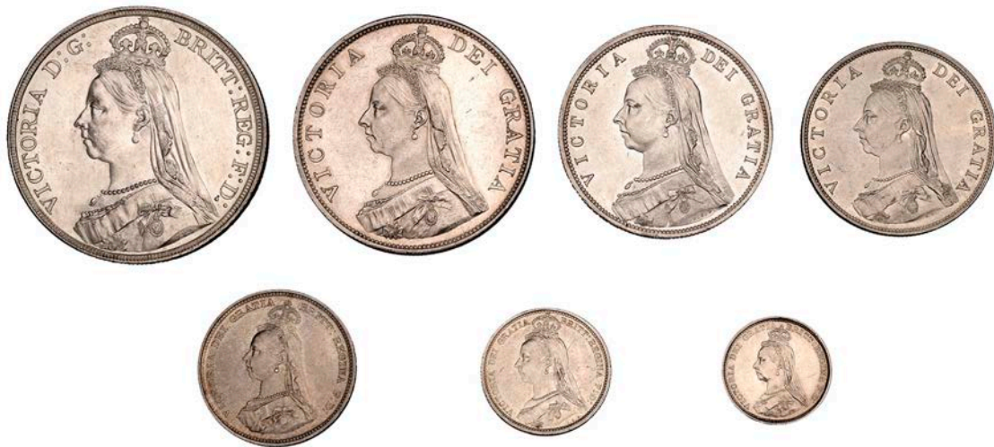
1351 Currency set, 1887, comprising Crown to Threepence (S 3921-2, 3924-6, 3928, 3931) [7]. Extremely fine, Crown, Double-Florin and Threepence cleaned bright; in later fitted case £300-£400