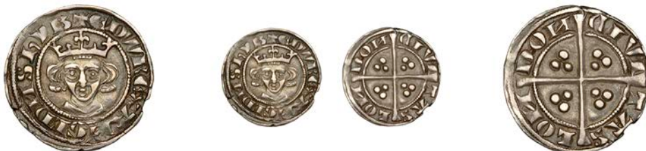
1097 New coinage, Penny, class 1c, London , reversed ns both sides, broken crown [not repaired], 1.32g/3h (SCBI North 32ff; N 1012; S 1382). Better than very fine, handsomely toned £100-£150

Provenance: R. Erskine Collection [from Galata 1979]