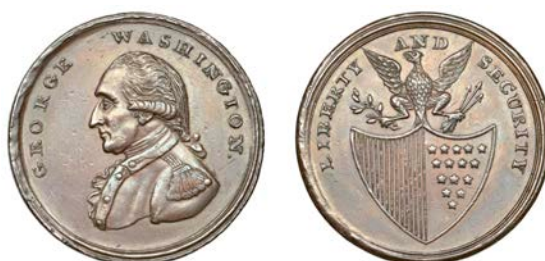
1501 George Washington, 'Liberty and Security' Penny, undated (1795), edge AN ASYLUM FOR THE OPPRESS'D OF ALL NATIONS, 19.37g/7h (Musante 45; Whitman 11050; Breen 1254; DH Middlesex 243). About extremely fine with a pleasing brown patina, rare in this condition £600-£800