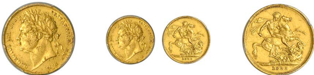
G 1296 Sovereign, 1823 (M 7; S 3800). Bright surfaces with several scratches, otherwise very fine or better [Graded by PCGS as AU Details]