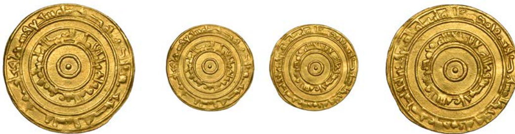
1518 al-'Aziz billah, Dinar, Misr, 367h, 4.12g (Nicol 701; Album 703). Better than very fine