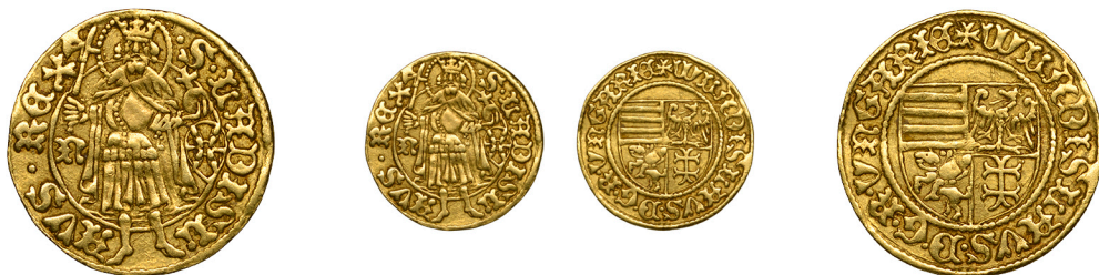
1448 Ladislav I Jagello , Forint or Goldgulden, c. 1440-44, mm. r and rounded shield, Nagybanya mint, 3.52g/6h (Lengyel 22/5; ÉH 466; Huszár 597). Toned, very fine and rare £700-£900