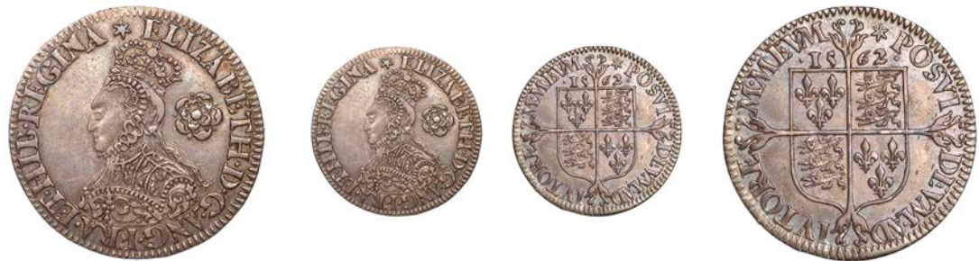
1140 Milled coinage, Sixpence, 1562, mm. star, bust C, tall bust, decorated dress, medium rose, 3.06g/6h (Borden/Brown 24, O3/R6; N 2026; S 2595). Nearly extremely fine with old cabinet toning £800-£1,000

Provenance: Bt A. Bryant; Covent Garden Collection