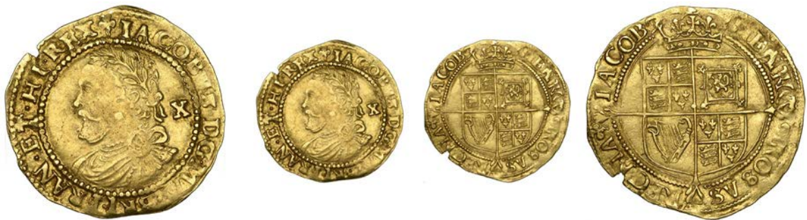
1155 Third Coinage, Half-Laurel, mm. trefoil [1624], fourth bust, 4.49g/6h (SCBI Schneider 92; N 2117; S 2641A). Chipped at 11 o'clock on obverse, otherwise very fine, reverse better £900-£1,200