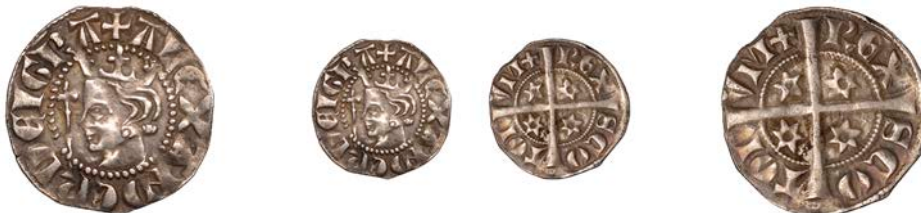
1383 Second coinage, Sterling, class D1/E mule, mm. cross potent on obv. , pattée on rev. , lettering incurved, bust left, rev. long cross, one star of five, three mullets of six points in angles, 1.32g/2h (SCBI 35, –; B 55/36, figs. 162/168; S 5057/5056). About very fine and excessively rare £200-£300