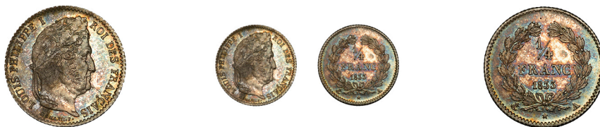
1427 Louis Philippe , Quarter-Franc, 1833A, Paris, mm. Jean-Pierre Collot (KM 740.1). Attractively toned, good extremely fine [Graded by NGC as MS 63] £100-£120