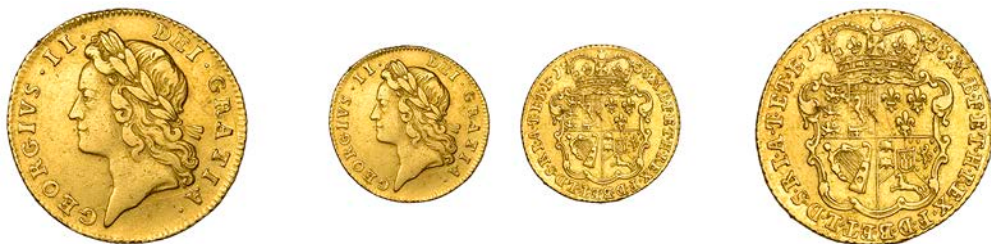
1241 Half-Guinea, 1738 (MCE 348; S 3681A). Cleaned, otherwise very fine