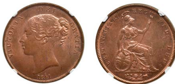
1344 Penny, 1841, no colon after REG (BMC 1484; S 3948). Toned with residual colour and lustre, good extremely fine [Graded by NGC as MS 63 RB]