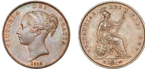
1346 Penny, 1858/6 (Gouby C; F -; BMC -; S 3948). Lightly toned with traces of original colour around devices, extremely fine and extremely rare £200-£300