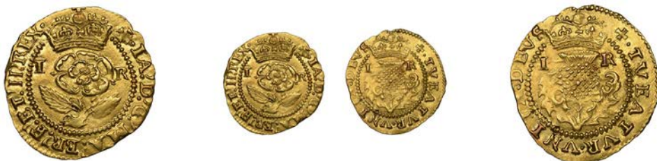
1152 Second coinage, Thistle Crown, mm. plain cross [1618-19], 1.99g/11h (SCBI Schneider –; N 2096; S 2627). A few minor edge marks, otherwise better than very fine and toned, the mint mark scarce £600-£800