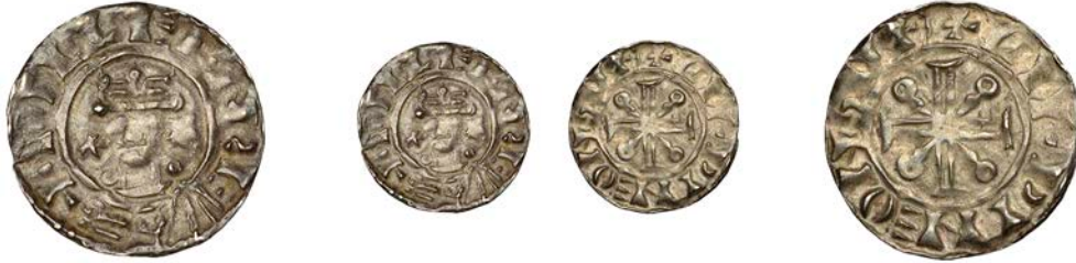
1085 Penny, Voided Cross type [BMC 3], Southwark , Leofwine, LIFFINE ON SUD, 1.38g/1h (Allen xxx; BMC 221; N 853; S 1260). Slightly blunt strike, otherwise good fine on a round flan, toned £900-£1,200