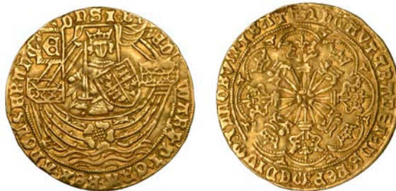
1119 Light Coinage, Ryal, London, mm. crown on rev. only, small fleurs in spandrels, 7.54g/2h (SCBI Schneider 358; N 1549; S 1950). Made round, otherwise very fine and clear, lightly toned £2,400-£3,000