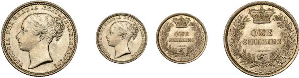
1334 Shilling, 1872, die 77 (ESC 3042; S 3906A). Some minor surface marks, better than extremely fine