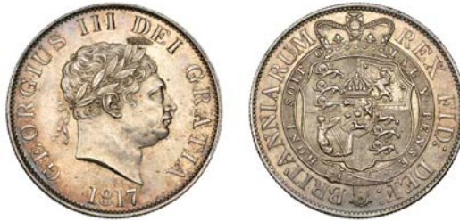
1292 Halfcrown, 1817, small head (ESC 2096; S 3789). Light obverse bagmarks, extremely fine