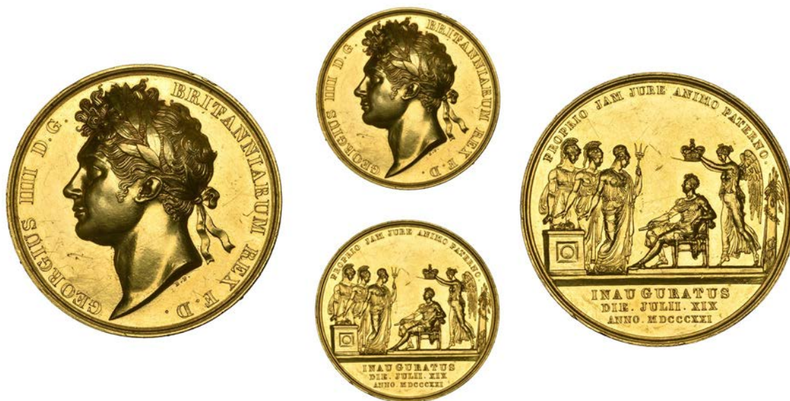
1546 Coronation of George IV, 1821 , a gold medal by B. Pistrucci, laureate head left, rev. Britannia, Scotia and Hibernia approaching the enthroned king being crowned by Victory, 35mm, 31.59g (BHM 1070; E 1146a). Fields scuffed with hairlines, otherwise about extremely fine £3,000-£4,000