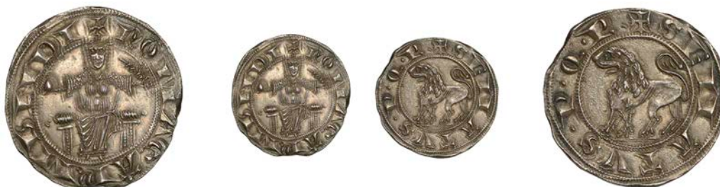
1479 ROME, Senate , anonymous Grosso, c. 1256-65, lion left, rev. Roma seated facing on throne, 3.49g/8h (Muntoni 59; Biaggi 2085). A trace of double-strike, otherwise good very fine or better, toned £240-£300