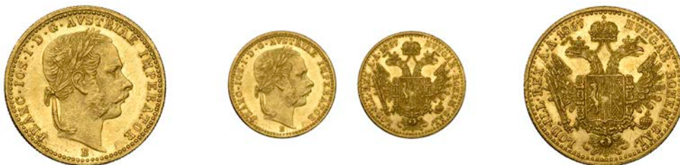
1407 Franz Joseph I, Ducat, 1867b, Kremnica (KM 2266). Lustrous with some light scratches on obverse, otherwise extremely fine