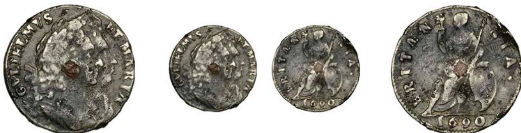
1215 Farthing, 1690 (Cooke 647; BMC 579; S 3451). Copper plug; fine or better for issue, largely free of tin pest £240-£300