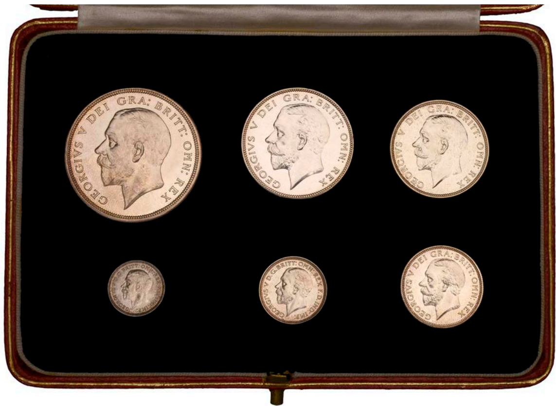
1358 Proof set, 1927, comprising Crown to Threepence [6]. Brilliant, as struck; in original red leather case of issue