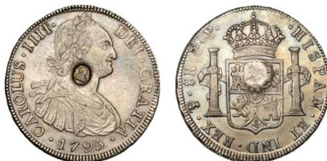
1273 BOLIVIA, Charles IV , 8 Reales, 1795 PP , Potosi, obv. countermarked with head of George III in oval, 27.03g/1h (ESC 1855; S 3765A). Toned with pleasing surfaces, good very fine, reverse better £300-£400 Provenance: Bt Grantham Coins, 5 April 1991