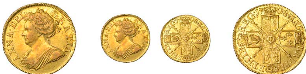
1222 Half-Guinea, 1708 (MCE 231; S 3575). Scratch in obverse field, otherwise better than very fine, rare