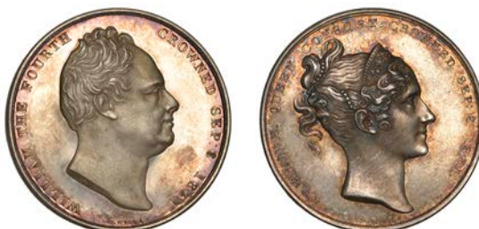
1548 Coronation of William IV and Queen Adelaide, 1831 , a silver medal by W. Wyon, bust right, rev. bust of Adelaide right, 33mm, 17.84g (BHM 1475; E 1251). Lightly clouded fields with toning in peripheries, extremely fine; in original fitted case of issue, rare £200-£300

Provenance: Sold for the benefit of Oxfam