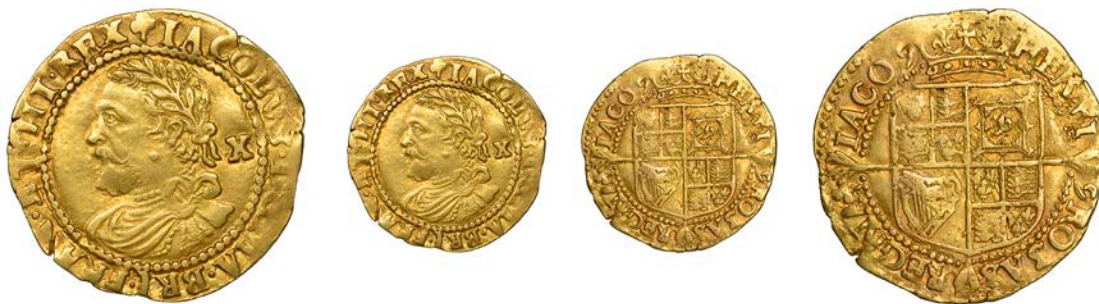
1156 Third coinage, Half-Laurel, mm. trefoil [1624], fourth bust, reads HENRI, 4.46g/8h (cf. SCBI Schneider 92; N 2117; S 2641A). Perhaps removed from a mount, otherwise lightly toned and about very fine, the legend unusual £800-£1,000