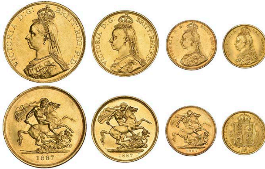
G 1350 Currency set, 1887, comprising Five Pounds to Half-Sovereign (S 3864-6, 3869) [4]. The first with hairlines, all otherwise good very fine or better £4,000-£5,000