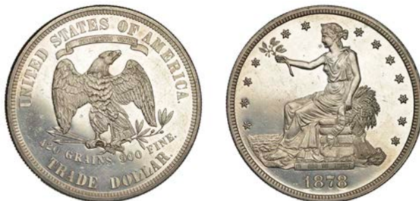
1497 Proof Trade Dollar, 1878 (KM 108). Extremely fine, minor hairlines and of bright appearance