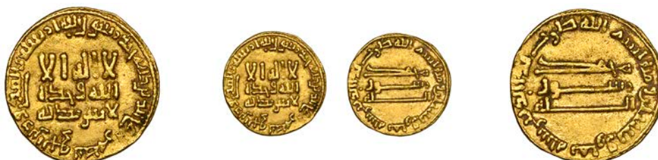
1510 al-Mahdi , Dinar, no mint, 168h, 4.25g/10h (Lowick 342 var.; Album 214). About very fine

This issue by the Caliph al-Ma'mun was an attempt to unify Sunni and Shi'ite Islam