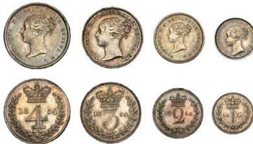
1342 Maundy Set, 1854 (ESC 3498; S 3916) [4]. All prettily toned, good extremely fine; accompanied by fitted red case