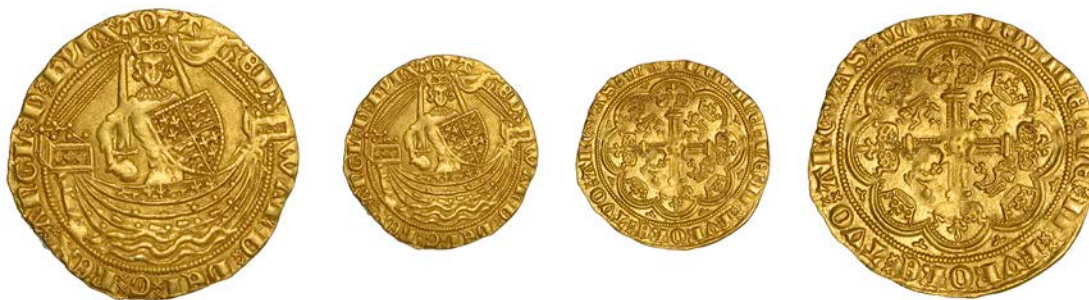
1098 Treaty period, Half-Noble, London, mm. cross potent on rev. only, annulet before ED, curule x, first a in ARGVAS unbarred, second barred, 3.85g/7h (SCBI Schneider 88-9; N 1239; S 1507). Better than very fine, clear portrait, some residual lustre £1,200-£1,500

Provenance: Found Norfolk September 1997