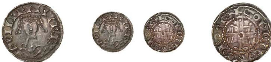
1079 Penny, Bonnet type [BMC II], Thetford , Godric, GODRIC ON DEOTFO, 1.19g/6h (Allen, 2022 p.182; SCBI Yorkshire 1179; N 842; S 1251). Good fine, dark tone £500-£600