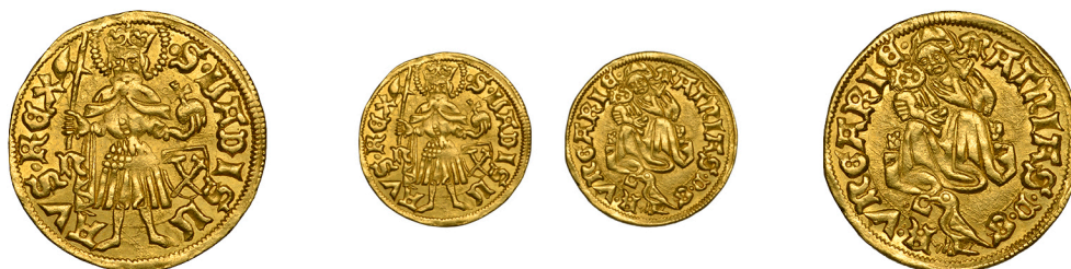
1452 Mattias Corvinus , Forint or Goldgulden, c. 1482-89, mm. n and crossed hammers in shield, Nagybanya mint, 3.51g/5h (Lengyel 45/4E; ÉH 540; Huszar 680). A pleasing example, good very fine or better £600-£800