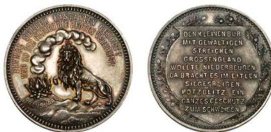
1596 GERMANY, British struggle in the Boer War , 1900, a satirical silver Medal by Nolte & Co., Berlin, lion pulling back paw from fire atop mountain labelled TRANSVAAL, rev. inscription across ten lines, wreath surrounding, 33mm, 14.67g (Hern 202; Laidlaw 212). Attractively toned, good extremely fine and rare £260-£360