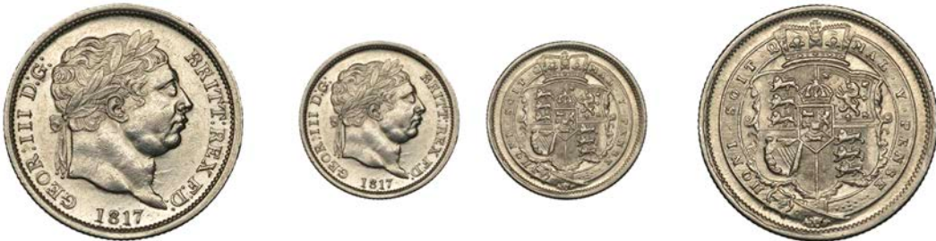
1293 Shilling, 1817, unbarred H in HONI, reads RRITT in obv. legend (bottom of B broken) (cf. ESC 2144; S 3790). Extremely fine, obverse lightly wiped, the combination of varieties rare