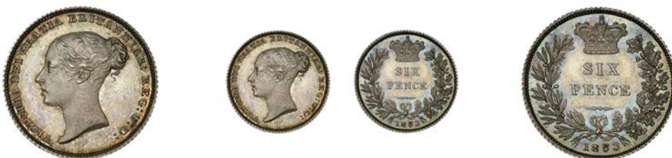
1338 Proof Sixpence, 1853, edge grained, 2.83g/6h (ESC 3190; S 3908). Minor graffiti on reverse, otherwise about as struck, toned