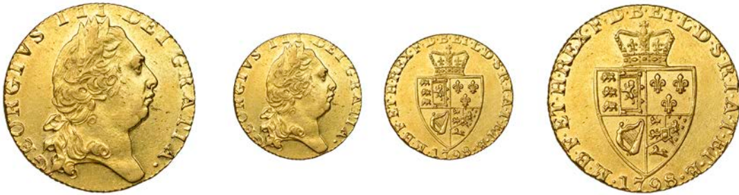
1249 Guinea, 1798, fifth bust (EGC 732; S 3729). Lightly cleaned, very fine or better £500-£600 Provenance: G. Lawrence Collection