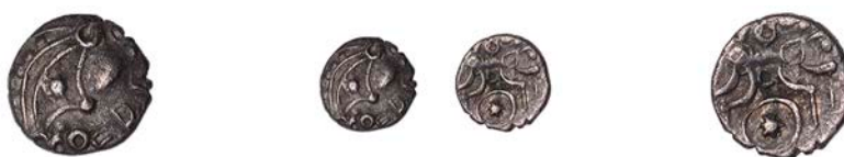
2129 EAST WILTSHIRE , Uninscribed issues, silver Unit, Wanborough Wheel type, highly stylised moon head right, central boss on face, lines and pellets for hair, rev. double-tailed annulate horse left, pellet on chest and rump, ring and star-in-ring below, ring above, 1.03g/4h (ABC 2134; BMC –; VA –; S –). Reverse off-centre, however very fine and toned, excessively rare £150-£200