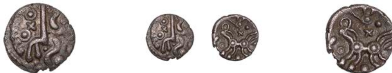
2099 DOBUNNI , Uninscribed issues, silver Unit, Cotswold Oxo type [Head Type F], moon head right, pellet triads for hair, pellet-in-ring for eye, cross and pellet-in-ring below, pellet in arcs behind, stalk lips, rev. triple-tailed annulate horse left, 'flower' motif below, cross above, pellet-in-rings around, 1.12g/11h (ABC 2027; BMC 2981-3000; VA 1078-1; S 377). Very fine for issue £100-£150