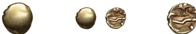
2009 GALLO-BELGIC , Uninscribed issues, gold Quarter-Stater, series D [Uniface type], plain, rev. tree-like object between two bars, bar below, 1.37g (Sills 28; ABC 43; BMC –; VA 69-3; S 10). Struck on a flan of attractive bright yellowish gold, good very fine £200-£300