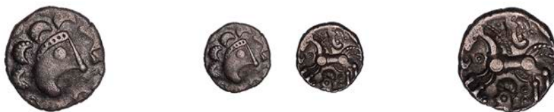
2082 DOBUNNI , Uninscribed issues, silver Unit, Cotswold Cock type [Head Type A], moon head right, pelleted crescents for hair, boss on chin, stalk lips, various ornaments around, rev. triple-tailed annulate horse left, cockerel's head below, bird's head and wheel above, pellet-in-rings around, 1.29g/12h (ABC 2012; BMC 2950-51; VA 1020-1; S 377). Attractive dark tone, very fine and rare £200-£260