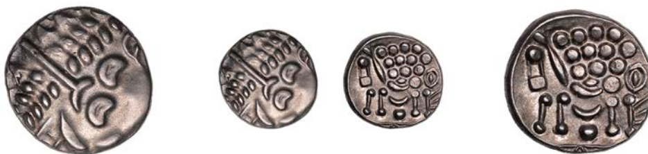
2133 DUROTRIGES , Uninscribed issues, silver Stater, Cranborne Chase type, devolved head of Apollo comprising wreath, cloak and crescents, rev. disjointed horse left, rectangular head, body of crescents, four vertical legs, three horizontal lines for tail, coffee bean above tail, large pellet below, twelve pellets above, zigzag and pellet pattern in exergue, 5.54g/3h (ABC 2157; BMC 2525-46, 2691-2727; VA 1235-1; S 364). Well-centred and bright, good very fine £200-£260