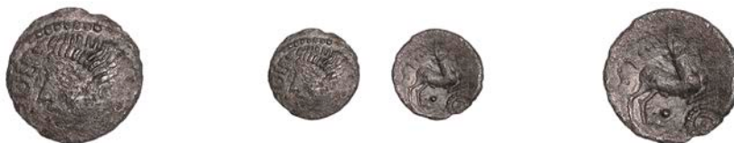
2100 DOBUNNI, Boduoc (c. 25-5 BC), silver Unit, Young Head type, head left, BOB[VOC] in front, rev. horse right, pelletal sun ring below, various pellets and rings above and around, 0.93g/5h (ABC 2042; BMC 3143-45; VA 1057-1; S 389). Rough surfaces, otherwise good fine and very rare £150-£200