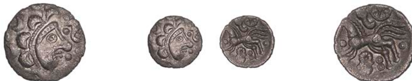
2083 DOBUNNI , Uninscribed issues, silver Unit, Cotswold Cock type [Head Type A], moon head right, pelleted crescents for hair, boss on chin, stalk lips, various ornaments around, rev. triple-tailed annulate horse left, cockerel's head below, bird's head and wheel above, pellet-in-rings around, 0.78g/12h (ABC 2012; BMC 2950-51; VA 1020-1; S 377). Slightly rough surfaces, otherwise better than very fine and rare £200-£260