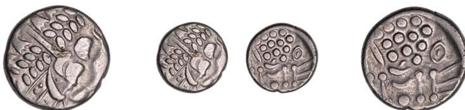
2135 DUROTRIGES , Uninscribed issues, silver Stater, Spread Tail type, devolved head of Apollo, rev. disjointed horse left, rectangular head, body of crescents, four vertical legs, twelve pellets above, coffee bean above tail, large pellet below, 5.39g/2h (ABC 2160; BMC 2662, 2690; VA 1238-1; S -). A few light marks, otherwise very fine and of good silver £120-£150