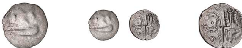
2148 DUROTRIGES , Uninscribed issues, silver Quarter-Stater, Badbury Rat type, trace of 'three men in a boat' design, rev. zigzag thunderbolt and line of pellets across field, various motifs including rodent-like object, double ring in field, 'clamshell' motif to one side, 0.86g (ABC 2214; BMC 2748-70; VA 1260-1; S 368). Lightly toned, very fine £100-£150