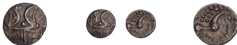
2072 ICENI, Ecen (c. AD 10-43), silver Unit, Symbol type [Y-Type], double crescent emblem on vertical wreath, rev. globular horse right, large oval head, pellet for eye, reversed s below, single line of dashes for mane, pellet below tail, pelletal sun above, three pellets and Y-shaped motif below, 0.90g (ABC 1681; BMC 4297-323; VA 752-1; S 436). Good fine, scarce £90-£120