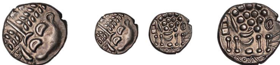
2134 DUROTRIGES , Uninscribed issues, 'white gold' Stater, Spread Tail type, devolved head of Apollo comprising wreath, cloak and crescents, rev. disjointed horse left, rectangular head, body of crescents, four vertical legs, three diverging lines for tail, coffee bean above tail, large pellet below, twelve pellets above, zigzag and pellet pattern in exergue, 6.15g/7h (ABC 2160; BMC 2662, 2690; VA 1238-1; S -). Well-centred and of good metal, attractively toned and about extremely fine, scarce in this condition £200-£260