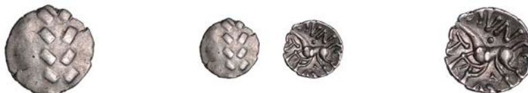
2078 CORIELTAUVI, Aunt Cost (c. AD 15-40), silver Half-Unit, Aunt Cost Half type, wreath dividing plain field, rev. horse left, double upper front legs, reversed lituus below tail, AVN above, retrograde COST below, 0.46g/1h (ABC 1953; BMC 3267-68; VA 918-1; S 404). Lightly toned and good very fine for issue £100-£150