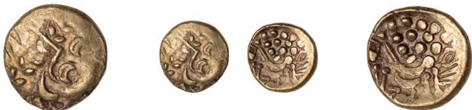
2025 BELGAE , Uninscribed issues, gold Stater, British B [Chute type], devolved head of Apollo right, rev. horse left, rectangular head, body of crescents, four vertical legs, many pellets above, three lines for tail, coffee-bean above, crab-like motif below, 5.39g/7h (ABC 746; BMC 35-76; VA 1205-1; S 22). Struck on a pale yellowish flan, some peripheral weakness otherwise very fine £400-£500