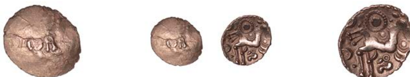
2102 DOBUNNI, Corio (c. 20 BC - AD 5), gold Quarter-Stater, Cor type, COR on plain field, rev. triple-tailed horse right, pelletal sun ring above, small animal below, 1.17g/7h (ABC 2051; BMC 3134; VA 1039-1; S 387). Obverse legend clear, which is uncommon for this type, a coppery-gold flan and better than very fine, extremely rare £600-£800