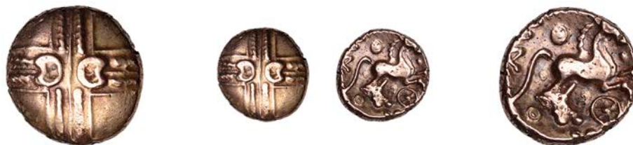
2156 CATUVELLAUNI, Addedomaros (c. 45-25 BC), gold Stater, Crescent Cross type, crossed wreaths, back-to-back crescents at centre, rev. horse right, pellet-in-ring above and behind, wheel below, ΑΒΔΙΙΔΟ[Μ] above, 5.69g (ABC 2514; BMC 2390-4; VA 1605-1; S 200). Struck from rusted dies, otherwise very fine and rare £400-£600