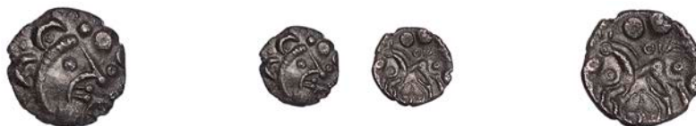
2128 EAST WILTSHIRE , Uninscribed issues, silver Unit, Upavon Moon Head type, moon head right, three crescents for hair, ring in each, large sunburst on chin, stalk lips, wheel before face, rev. horse left, feather tail, small ring and large wheel below, small ring and two pellet bosses above, 0.71g/3h (ABC 2128; BMC 3013-17; VA –; S –). Well-centred, dark tone, very fine and scarce £150-£200