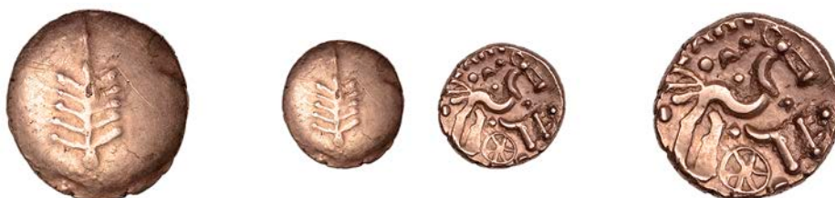
2103 DOBUNNI, Catti (c. AD 1-20), gold Stater, Catti Tree type, Dobunnic leaf emblem, pellet at base, on plain field, rev. triple-tailed horse right, pellets and saltires around, six-spoked wheel below, CATTI above, 5.28g/10h (ABC 2057; BMC 3057-60; VA 1130-1; S 384). Reverse struck from rusted dies, otherwise well-centred and an attractive coppery gold £600-£800