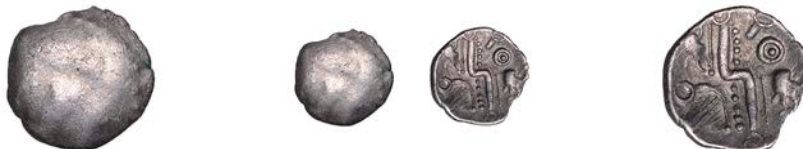
2147 DUROTRIGES , Uninscribed issues, silver Quarter-Stater, Badbury Rat type, trace of 'three men in a boat' design, rev. zigzag thunderbolt and line of pellets across field, various motifs including rodent-like object, double ring in field, 'clamshell' motif to one side, 0.70g (ABC 2214; BMC 2748-70; VA 1260-1; S 368). Lightly toned, better than very fine £100-£150