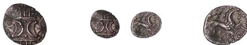
2073 ICENI, Seanu (c. AD 30-43), silver Unit, Seanu type, double crescent emblem on vertical wreath, rev. horse right, double upper right front leg, solid Y-shaped head, single dashes for mane, six pellets on shoulder, pelletal sun above, SAENV below, 1.21g (ABC 1699; BMC 4540-57; VA 770-1; S 466). Very fine, scarce £100-£150