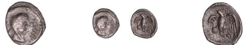
2051 ATREBATES and REGNI, Epaticcus (c. AD 20-40), silver Unit, Eagle type, bust right, wearing lion-skin, EPATI before face, rev. eagle with open wings, holding serpent in talons, pellet-in-ring within field, 0.99g/1h (ABC 1346; BMC 2024-293; VA 580-1; S 356). Mottled surfaces, fine for issue £90-£120