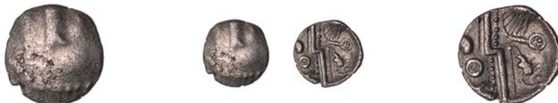
2146 DUROTRIGES , Uninscribed issues, silver Quarter-Stater, Badbury Rat type, trace of 'three men in a boat' design, rev. zigzag thunderbolt and line of pellets across field, various motifs including rodent-like object, double ring in field, 'clamshell' motif to one side, 0.91g (ABC 2214; BMC 2748-70; VA 1260-1; S 368). Lightly toned, better than very fine for issue £100-£150