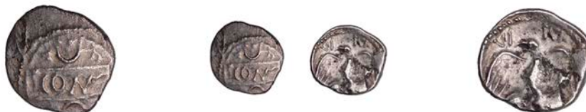
2047 ATREBATES and REGNI, Verica (c. AD 10-40), silver Unit, Eagle type, COM F in tablet, scroll-like decoration above and below, rev. eagle standing left, VIRI above, 1.29g/4h (ABC 1226; BMC 1485-505; VA 471-1; S 138). Good fine, scarce £80-£100

Provenance: DNW Auction 74, 20 June 2007, lot 25