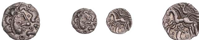
2085 DOBUNNI , Uninscribed issues, silver Unit, Cotswold Eagle [Head Type B] type, moon head right, pelleted crescents for hair, large boss on chin, stalk lips, rev. triple-tailed horse left, 'flower' motif below, stylised bird's head above, 0.98g/7h (ABC 2015; BMC 2953-62; VA 1042-1; S 377). Better than very fine, lightly toned £150-£200