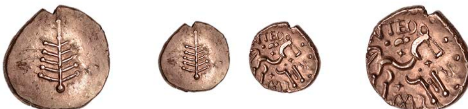
2104 DOBUNNI, Anted (c. AD 20-43), gold Stater, Anted Rig type, Dobunnic tree emblem, pellet at base, on plain field, rev. triple-tailed horse right, small celestial ornaments and pellets around, six-spoked wheel below, [A]NTED above, RIC[-] below, 5.31g/11h (ABC 2066; BMC 3023-7; VA 1066-1; S 379). Struck on a flan of light coppery gold, well-centred and good very fine £1,000-£1,500