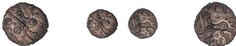
2108 DOBUNNI, Eisu (c. AD 20-43), silver Unit, Oxo type, head right, pellet-in-ring for eyes, cross and pellet-in-ring below, pellets in arcs behind, stalk lips, rev. triple-tailed annulate horse left, pellet and EI above, pellet and sv below, 0.82g/7h (ABC 2081; BMC 3043-51, 3054-55; VA 1110-1; S 382). Rough surfaces, otherwise toned and very fine for issue £100-£150

Provenance: Found near Compton Dando, Somerset, September 1991