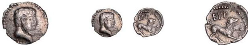
2044 ATREBATES and REGNI, Eppillus (c. 20 BC - AD 1), silver Unit, Lion type, bearded head right, pellet border, rev. lion right, EPP above, [COM] below, F before, 1.26g/6h (ABC 1166; BMC 1088-115; VA 417-1; S 101). Scraped at 4 o'clock, otherwise bright, very fine and rare £100-£150