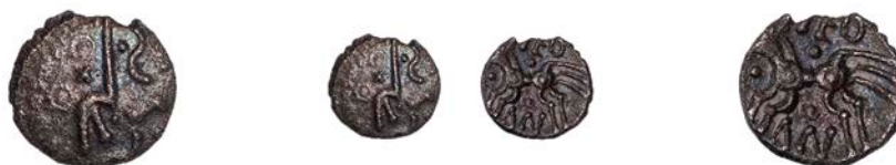
2107 DOBUNNI, Anted (c. AD 20-43), silver Unit, Anted type, head right, pellets for hair, pellet-in-ring for eye, cross and pellet in ring below, pellets in arc behind, stalk lips, rev. triple-tailed horse left, TED above, AN and pellet-in-ring below, 0.75g/12h (ABC 2072; BMC 3032-38; VA 1082-1; S 380). Chipped at 12 o'clock, however prettily toned, good fine for issue and scarce £150-£200

Provenance: Found near Compton Dando, Somerset, September 1991