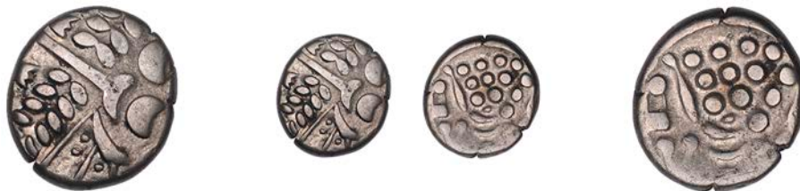
2131 DUROTRIGES , Uninscribed issues, silver Stater, Cranborne Chase type, devolved head of Apollo comprising wreath, cloak and crescents, rev. disjointed horse left, rectangular head, body of crescents, four vertical legs, large pellet below, twelve pellets above, 4.79g/5h (ABC 2157; BMC 2525-46, 2691-2727; VA 1235-1; S 364). Good fine £100-£150