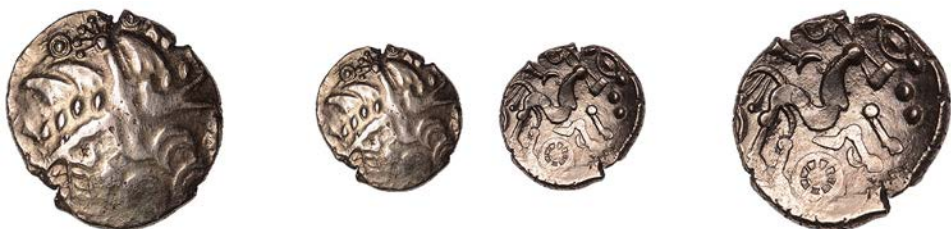
2029 BELGAE , Uninscribed issues, gold Stater, British Q [Cheriton Wheel], devolved head of Apollo right, rev. triple-tailed horse right, wheel below, charioteer's arms above, eye motif and pellets before, 5.38g/1h (Sills 213; ABC 758; BMC 446; VA -, S -). Better than very fine £500-£700

Provenance: Found Compton Marden, Sussex, 1990