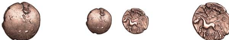
2011 CANTII , Uninscribed issues, gold Quarter-Stater, Corded Triangle type, plain, rev. horse left, corded triangle above, cross-hatched net below, pellet-in-rings around, 1.24g (ABC 198; BMC 2469-71; VA 151-1; S 172). Well-centred and very fine, rare £240-£300