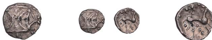
2070 ICENI, Ecen (c. AD 10-43), silver Unit, Symbol type [Y-Type], double crescent emblem on vertical wreath, rev. globular horse right, single line of dashes for mane, pellet below tail, pelletal sun above, three pellets and Y-shaped motif below, 0.95g (ABC 1681; BMC 4297-323; VA 752-1; S 436). About fine, scarce £80-£100