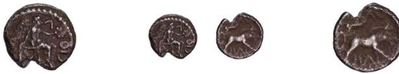
2054 ATREBATES and REGNI, Epaticcus (c. AD 20-40), silver Unit, Victory type, Victory seated right, [TAS]C[IOV] around, rev. boar right, tree above, EPAT below, 1.15g/6h (ABC 1349; BMC 2294-328; VA 581-1; S 357). Chipped at 6 o'clock, about fine and scarce £90-£120