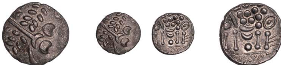
2132 DUROTRIGES , Uninscribed issues, silver Stater, Cranborne Chase type, devolved head of Apollo comprising wreath, cloak and crescents, rev. disjointed horse left, rectangular head, body of crescents, four vertical legs, three horizontal lines for tail, coffee bean above tail, large pellet below, twelve pellets above, zigzag and pellet pattern in exergue, 4.27g/1h (ABC 2157; BMC 2525-46, 2691-2727; VA 1235-1; S 364). Struck on a large flan, very fine £150-£200