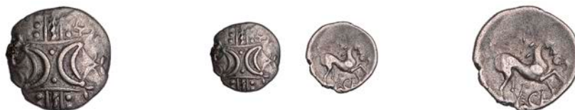
2069 ICENI, Ecen (c. AD 10-43), silver Unit, Stepping Horse type, double crescent emblem on vertical wreath, rev. horse stepping right, solid head facing, s below head, corn-ear mane, three leaves on shoulder, EEN below, 1.16g (ABC 1660; BMC 4348-430; VA 760-1; S 445). Good fine £100-£150