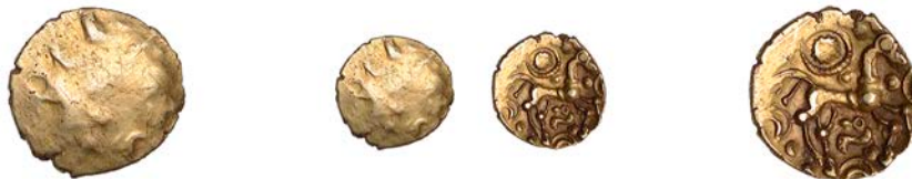
2080 DOBUNNI , Uninscribed issues, gold Quarter-Stater, Sunburst Little Horse type, trace of wreath, crescent and spike with three large pellets and sunburst design, rev. triple-tailed annulate horse right, cogwheel sun motif above, small stylised animal below, 1.38g (ABC 2009; BMC 2942-46; VA 1010-3; S 375). Obverse struck from obliterated dies, as is usual, otherwise a highly attractive example of this rare type, very fine £400-£600