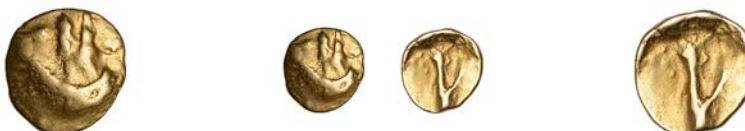
2010 GALLO-BELGIC , Uninscribed issues, gold Quarter-Stater, series D [Branch type], trace of 'two men in a boat' design, rev. branch-like pattern, 1.49g (Sills 23 [O3/R2?]; ABC 43; BMC –; VA 69-3; S 10). Struck on a flan of bold yellowish gold, good very fine for type £200-£300