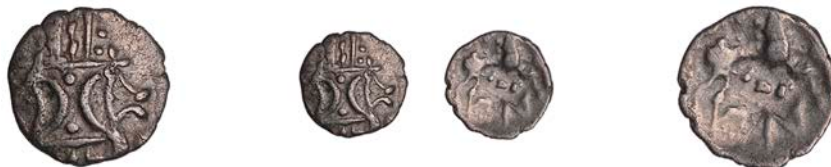
2068 ICENI, Ecen (c. AD 10-43), silver Unit, Corn Ear type, double crescent emblem on vertical wreath, rev. horse right, corn-ear mane, pelletal sun above, three pellets and [E]CEN below, 0.94g (ABC 1657; BMC 4033-125; VA 730-1; S 443A). Fine, obverse better £90-£120