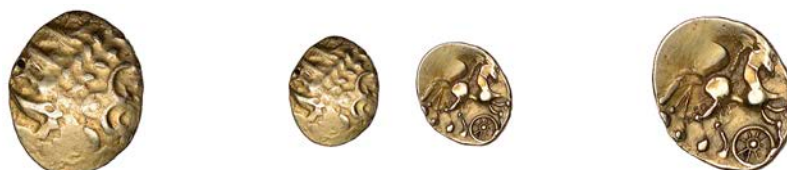
2110 EAST WILTSHIRE, Uninscribed issues, gold Quarter-Stater, Three Wheels [Right] type, wreath design with hidden face, wheel below, rev. triple-tailed horse right, wheel above and below, 1.35g/6h (ABC 2093; BMC 498-502; VA 224-1; S 48). Some peripheral weakness, otherwise very fine and extremely rare £240-£300