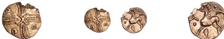
2158 CATUVELLAUNI, Tasciovanus (c. 25 BC - AD 10), gold Quarter-Stater, Acorn type, crossed wreaths, one curved, back-to-back crescents at centre, teardrop motifs in angles, rev. horse stepping left, acorn-like object below, 1.24g (ABC 2586; BMC 1651-3; VA 1688-1; S 221). Chipped, however well-centred, very fine and very rare £300-£400