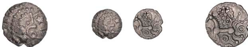
2125 EAST WILTSHIRE , Uninscribed issues, silver Unit, Six-Spoked Pellet Ring, moon head right, large star on chin, pellet hairline, ring in place of lips, stars and pseudo-legend in front, rev. double-tailed horse left, two pellets and large wheel above, pellet-in-ring motifs in front, below and before, 0.96g/3h (ABC 2125; BMC 3019-20; VA 1171-1; S 378). Some light porosity, otherwise very fine and very rare £100-£150