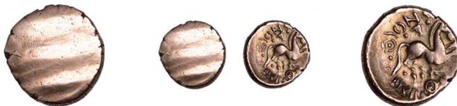
2012 CANTII, Dubnovellaunos (c. 25 BC - AD 5), gold Stater, Serpent type, plain, traces of banding, rev. horse leaping right, bucranium above, serpent below, DVBN[OVALLAV]NOS around, 5.43g (ABC 303; BMC 2492-96; VA 169-1; S 177). Struck a little off-centre, otherwise very fine with light coppery tones, very rare £700-£900