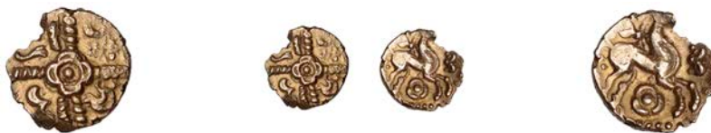
2155 CATUVELLAUNI , Uninscribed issues, gold Quarter-Stater, Rose Wings type, crossed wreaths, rose-like motif at centre, rev. horse right, pellet with three 'petals' below, double wing motif above, 1.14g (ABC 2469; BMC –; VA 244-1; S 48). Chipped, however better than very fine and extremely rare £300-£400