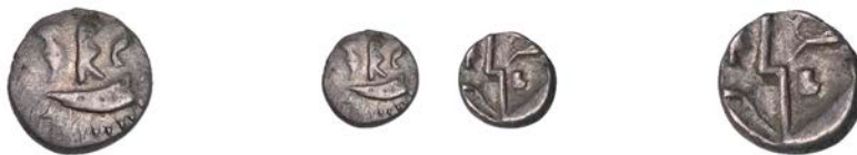
2142 DUROTRIGES , Uninscribed issues, silver Quarter-Stater, Duro Boat Bird type, 'three men in a boat' design, pellet rosette to left, rev. zigzag thunderbolt across field, Y-shape and uncertain objects each side, 1.03g/7h (ABC 2208; BMC 2734-47; VA 1242-1; S 368). Lightly toned, good fine £100-£150