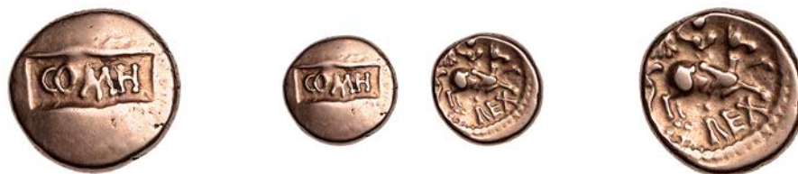
2045 ATREBATES and REGNI, Verica (c. AD 10-40), gold Stater, Warrior Rex Type, COM F in central tablet, rev. warrior riding on horse right, holding spear, VIR above, REX below, 5.32g/4h (Sills 364; ABC 1190; BMC 1146-58; VA 500-1; S 120). Struck on a flan of light rosy gold, very fine £400-£600