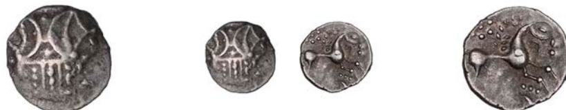
2071 ICENI, Ecen (c. AD 10-43), silver Unit, Symbol type [Y-Type], double crescent emblem on vertical wreath, rev. globular horse right, large oval head, pellet for eye, reversed s below, single line of dashes for mane, pellet below tail, pelletal sun above, three pellets and Y-shaped motif below, 1.27g (ABC 1681; BMC 4297-323; VA 752-1; S 436). Good fine, scarce £90-£120