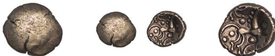
2109 EAST WILTSHIRE, Uninscribed issues, gold Stater, Savernake Forest type, plain field, rev. skinny horse right, pellet mane, solar spiral above and large wheel below, torc-like motif before, pellets around, 4.17g (ABC 2091; BMC 361-4; VA 1526-1; S 37). Struck on a compact flan of base gold, very fine and rare £240-£300