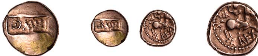
2046 ATREBATES and REGNI, Verica (c. AD 10-40), gold Stater, Warrior Rex Type, COM F in central tablet, rev. warrior riding on horse right, holding spear, VIR above, REX below, 5.35g/6h (Sills 364; ABC 1190; BMC 1146-58; VA 500-1; S 120). Slightly off-centre, otherwise good fine, stuck on a flan of attractive rosy gold £400-£600

Provenance: DNW Auction 74, 20 June 2007, lot 25