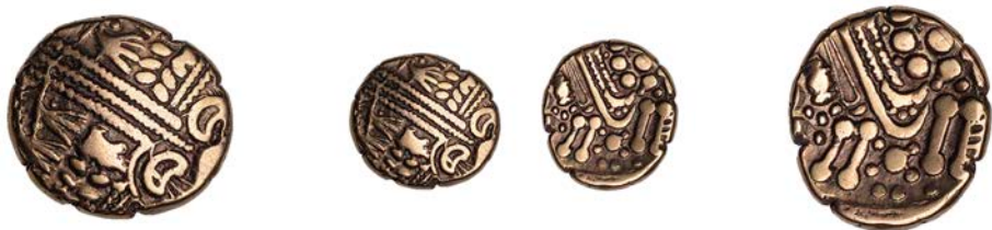
2028 BELGAE , Uninscribed issues, gold Stater, British D [Cheriton Smiler type], wreath split by three corded lines leading to 'turf cutter', rev. disjointed horse left, pellets above, three lines for tail, crab below, 5.23g/2h (Sills 314, class 2b [O7/R11]; ABC 755; BMC 86-7; VA 1215-1; S 24). A very attractive example of this type, a pleasing bold yellow gold and very fine, rare £500-£700

Provenance: Found Compton Marden, Sussex, 1990