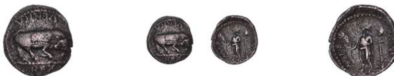
2048 ATREBATES and REGNI, Verica (c. AD 10-40), silver Unit, Head on Spear type, bull butting right, VERICA above, REX in exergue, rev. figure standing left, holding branch in right hand and head on spear in left hand, COMMI F around, 1.21g/11h (ABC 1235; BMC 1450-84; VA 506-1; S 137). Surface crazing, otherwise dark tone and very fine, scarce £100-£150