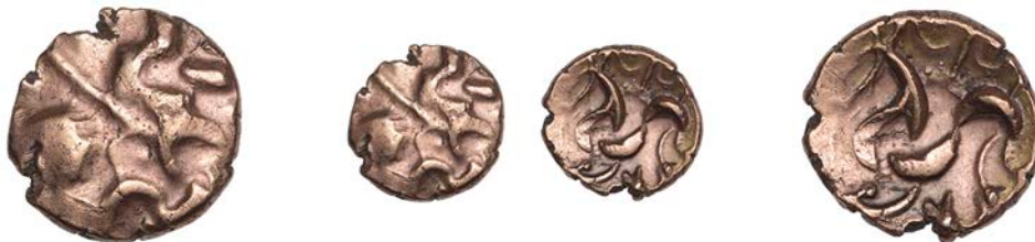
2075 CORIELTAUVI , Uninscribed issues, gold Stater, South Ferriby type, wreath, cloak and crescents, rev. lunate horse left, 'anchor' face above, star sun below, 5.26g/7h (ABC 1743; BMC 3148-78; VA 835-1; S 390). Struck on a coppery gold flan, about very fine £300-£400