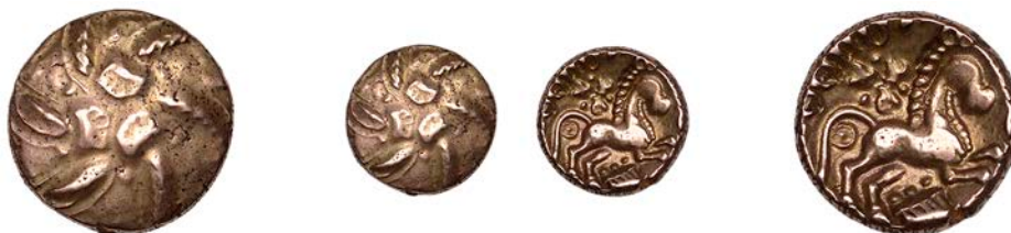
2157 CATUVELLAUNI, Addedomaros (c. 45 - 25 BC), gold Stater, Spiral type, six-armed wreath spiral, three crescents at centre, rev. horse right, cornucopia below, three horse muzzles and ΑΒΔΙΙΔΟ[Μ] above, pellet-in-ring below tail, 5.53g (ABC 2517; BMC 2396-404; VA 1620-1; S 201). Obverse weakly struck, otherwise very fine, struck on flan of yellowish gold with coppery toning £600-£800