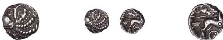
2160 CATUVELLAUNI, Tasciovanus (c. 25 BC - AD 10), silver Unit, Braided Hair type, head left, corded hair, rev. long-horned horse stepping right, bucranium above, solar motif below, 0.59g/3h (ABC 2604; BMC 1654; VA 1698-1; S 227). Off-centre, however very fine and very rare £150-£200