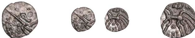
2105 DOBUNNI, Anted (c. 20-43), silver Unit, Anted type, head right, pellets for hair, pellet-in-ring for eye, cross and pellet-in-ring below, pellets in arc behind, stalk lips, rev. triple-tailed horse left, TED above, AN and pellet-in-ring below, 0.86g/8h (ABC 2072; BMC 3032-38; VA 1082-1; S 380). Slightly off-centre, however bright and very fine for issue, scarce £150-£200