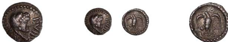
2049 ATREBATES and REGNI, Epaticcus (c. AD 20-40), silver Unit, Eagle type, bust right, wearing lion-skin, EPATI before face, rev. eagle with open wings, holding serpent in talons, pellet-in-ring within field, 1.14g/5h (ABC 1346; BMC 2024-293; VA 580-1; S 356). Rough surfaces, dark tone and very fine for issue £100-£150