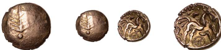
2101 DOBUNNI, Corio (c. 20 BC - AD 5), gold Stater, Dobunnic tree emblem, pellet at base, plain field, rev. triple-tailed horse right, wheel below, crescent and COR[IO] above, 5.49g/6h (CCI 97.1291, this coin ; ABC 2048; BMC 3064ff; VA 1035-1; S 386). Reverse die a little rusted, otherwise struck on a flan of light coppery gold, horse well-centred and better than very fine £600-£800 Provenance: Ex Matthew Rich Collection; Noble Numismatics Auction 52, November 1996, lot 1077; C. Rudd List 74, March 2004, no. 47