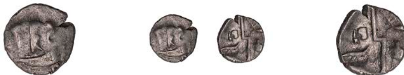
2144 DUROTRIGES , Uninscribed issues, silver Quarter-Stater, Duro Boat Bird type, 'three men in a boat' design, pellet rosette to left, rev. zigzag thunderbolt across field, Y-shape and uncertain objects each side, 0.98g/10h (ABC 2208; BMC 2734-47; VA 1242-1; S 368). Flan cracked at 2 o'clock, otherwise fine £100-£150