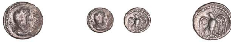
2053 ATREBATES and REGNI, Epaticcus (c. AD 20-40), silver Unit, Eagle type, bust right, wearing lion-skin, EPATI before face, rev. eagle with open wings, holding serpent in talons, pellet-in-ring within field, 1.20g/12h (ABC 1346; BMC 2024-293; VA 580-1; S 356). Some light surface scratches, otherwise very fine and bright £150-£200