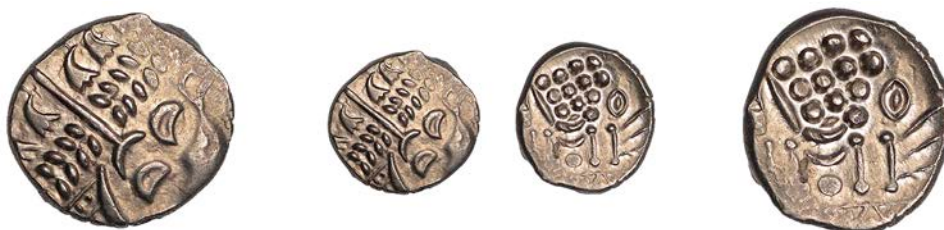
2130 DUROTRIGES , Uninscribed issues, 'white gold' Stater, Cranborne Chase type, devolved head of Apollo comprising wreath, cloak and crescents, rev. disjointed horse left, rectangular head, body of crescents, four vertical legs, three horizontal lines for tail, coffee bean above tail, large pellet below, twelve pellets above, zigzag and pellet pattern in exergue, 5.94g/3h (ABC 2157; BMC 2525-46, 2691-2727; VA 1235-1; S 364). Weakness before the horse, otherwise of good metal with subtle golden toning, about extremely fine £240-£300