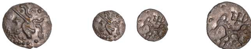
2106 DOBUNNI, Anted (c. AD 20-43), silver Unit, Anted type, head right, pellets for hair, pellet-in-ring for eye, cross and pellet in ring below, pellets in arc behind, stalk lips, rev. triple-tailed horse left, TED above, AN and pellet-in-ring below, 0.83g/2h (ABC 2072; BMC 3032-38; VA 1082-1; S 380). Very fine for issue, scarce £150-£200