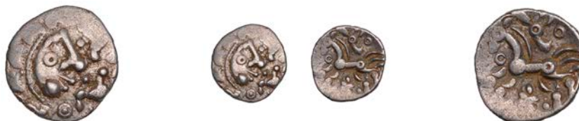
2084 DOBUNNI , Uninscribed issues, silver Unit, Cotswold Eagle [Head Type B] type, moon head right, pelleted crescents for hair, large boss on chin, stalk lips, rev. triple-tailed horse left, 'flower' motif below, stylised bird's head above, 0.90g/4h (ABC 2015; BMC 2953-62; VA 1042-1; S 377). Light surface deposits, otherwise very fine for issue £100-£150