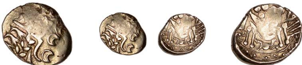
2026 BELGAE , Uninscribed issues, gold Stater, British B [Chute type], devolved head of Apollo right, rev. horse left, rectangular head, body of crescents, four vertical legs, many pellets above, three lines for tail, coffee-bean above, crab-like motif below, 6.14g/11h (ABC 746; BMC 35-76; VA 1205-1; S 22). Somewhat softly struck on an oblong flan of pleasing light yellow gold, good fine £300-£400

Provenance: Chute Hoard II, Wiltshire, 6 August 1994