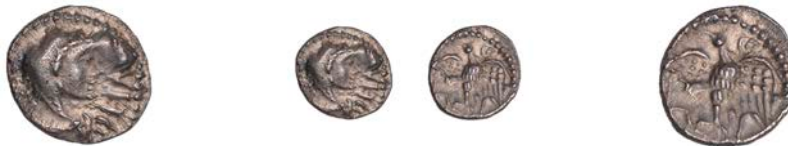
2050 ATREBATES and REGNI, Epaticcus (c. AD 20-40), silver Unit, Eagle type, bust right, wearing lion-skin, EPA[TI] before face, rev. eagle with open wings, holding serpent in talons, pellet-in-ring within field, 1.39g/7h (ABC 1346; BMC 2024-293; VA 580-1; S 356). Extra metal on the obverse, otherwise attractive light toning and very fine £100-£150