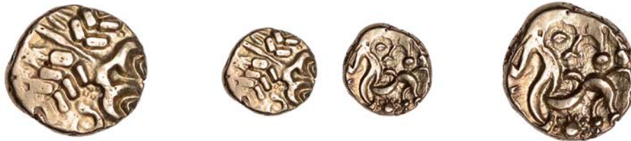
2074 CORIELTAUVI , Uninscribed issues, gold Stater, North East Coast Sun type, wreath, cloak and crescents, rev. disarticulated sinuous horse left, many pellets and charioteer's arms above, pelletal sun below, 5.92g/4h (ABC 1731; BMC 201-2; VA 805-9; S 29). Struck on a compact flan, otherwise very fine, lightly toned, very rare £500-£700