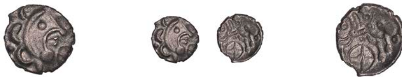
2126 EAST WILTSHIRE , Uninscribed issues, silver Unit, Upavon Moon Head, moon head right, three crescents for hair, large sunburst on chin, stalk lips, wheel in front of face, rev. horse left, feather tail, small ring and large wheel below, small ring and two pellet bosses above, 0.89g/7h (ABC 2128; BMC 3013-17; VA –; S –). Toned and very fine for issue, scarce £150-£200