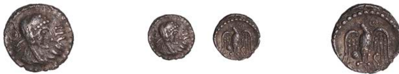
2052 ATREBATES and REGNI, Epaticcus (c. AD 20-40), silver Unit, Eagle type, bust right, wearing lion-skin, EPATI before face, rev. eagle with open wings, holding serpent in talons, pellet-in-ring within field, 1.16g/1h (ABC 1346; BMC 2024-293; VA 580-1; S 356). Rough surfaces, otherwise well-centred, very fine and toned £150-£200