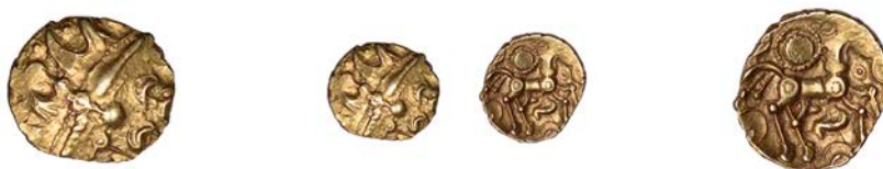
2079 DOBUNNI , Uninscribed issues, gold Quarter-Stater, Sunburst Little Horse type, wreath, spike with three large pellets and sunburst design, crescents below, rev. triple-tailed annulate horse right, cogwheel sun motif above, small stylised animal below, 1.23g/1h (ABC 2009; BMC 2942-46; VA 1010-3; S 375). Minute striking crack at 6 o'clock, otherwise better than very fine for issue and very rare £500-£700