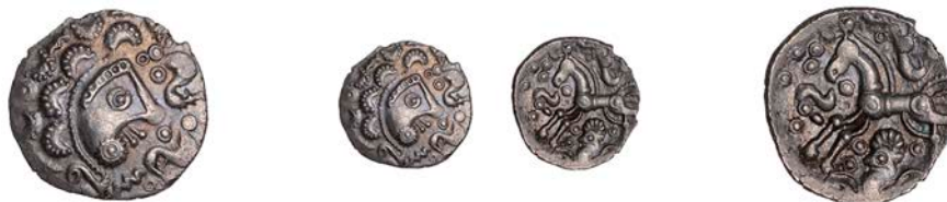
2081 DOBUNNI , Uninscribed issues, silver Unit, Cotswold Cock type [Head Type A], moon head right, pelleted crescents for hair, boss on chin, stalk lips, various ornaments around, rev. triple-tailed annulate horse left, cockerel's head below, bird's head and wheel above, pellet-in-rings around, 1.20g/9h (ABC 2012; BMC 2950-51; VA 1020-1; S 377). Lightly toned and well-centred, a stunning example of this rare type, about extremely fine £240-£300