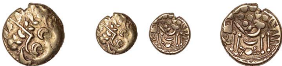
2027 BELGAE , Uninscribed issues, gold Stater, British B [Chute type], devolved head of Apollo right, rev. horse left, rectangular head, body of crescents, four vertical legs, many pellets above, three lines for tail, coffee-bean above, crab-like motif below, 6.11g/12h (ABC 746; BMC 35-76; VA 1205-1; S 22). Well-centred, very fine, toned £400-£600

Provenance: Chute Hoard II, Wiltshire, 6 August 1994