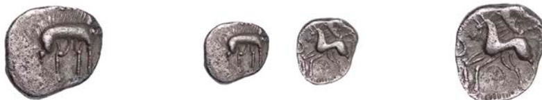
2077 CORIELTAUVI , Uninscribed issues, silver Unit, Proto Boar [No Spear] type, boar right, curly tail, large solar rosette above, rev. horse left, large pelletal sun ring above, pellet-in-ring below, 1.32g/3h (ABC 1782; BMC 3199ff; VA 855-5; S 396). Irregular flan, otherwise good fine £100-£150