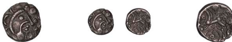
2127 EAST WILTSHIRE , Uninscribed issues, silver Unit, Upavon Moon Head type, moon head right, three crescents for hair, ring in each, large sunburst on chin, stalk lips, wheel before face, rev. horse left, feather tail, small ring and large wheel below, small ring and two pellet bosses above, 0.89g/7h (ABC 2128; BMC 3013-17; VA –; S –). Dark tone, very fine and scarce £150-£200