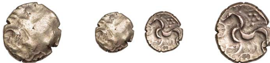
2076 CORIELTAUVI , Uninscribed issues, gold Stater, Kite type, wreath and crescent design, four-spoked wheel in place of cloak, rev. lunate horse left, diamond 'kite' shape containing four pellets above, four-armed spiral anticlockwise below, 5.20g/9h (ABC 1761; BMC 3181-84; VA 825-1; S 392). Struck from worn dies on a flan of light yellowish gold, a few marks on obverse, good fine and rare £240-£300