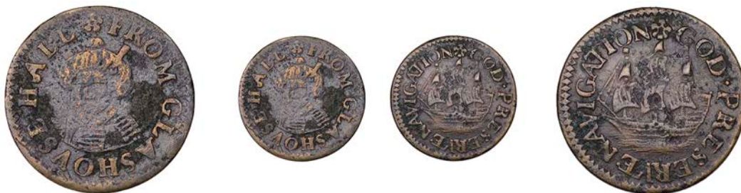
332 METROPOLITAN MIDDLESEX, Glasshouse Hall [Stepney], Penny, GOD PRESERVE NAVIGATION, 3.90g/12h (N 9290; BW. 1155). Fine £100-£150

Provenance: Dora Harris Collection, DNW Auction 56, 11 December 2002, lot 543 (part) [from Stanley Gibbons May 1980]