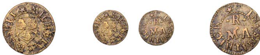
77 Falmouth , Michell Russell, Farthing, 0.93g/12h (N 534 obv., different rev.; BWV. 11). Surface deposits, otherwise good fine £150-£200 Provenance: J.A.D. Mayne Collection, Spink Auction 145, 12-14 July 2000, lot 2668 [from Seaby May 1981].