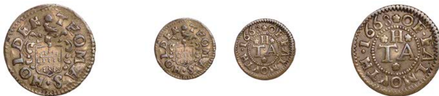
72 Falmouth , Thomas Holden, Farthing, 1668, 0.58g/6h (N –; BW. 5). About very fine, very rare