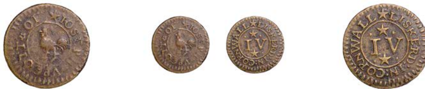
95 Liskeard , Joseph Upcott, Farthing, 0.94g/6h (N –; D 32A). Obverse good fine, reverse very fine, extremely rare £400-£500