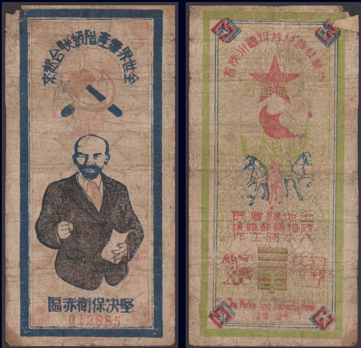
WORKER AND PEASANTS BANK