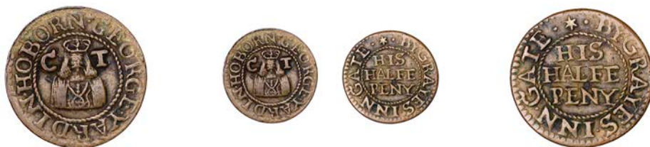
330 METROPOLITAN MIDDLESEX, George Yard [Gray's Inn Gate], T.C., Halfpenny, 1.30g/6h (N –; BW. 1233), C.T., Halfpenny, 1.21g/3h (N –; cf. D 1233) [2]. First fair, second about very fine, very rare £80-£100