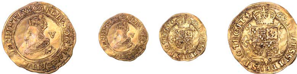
2147 Gold Crown, Gp A, class I, mm. lis [1625], bust 1, 2.29g/2h (SCBI Brooker –; SCBI Schneider 219, same dies; N 2179; S 2709). Good fine and toned £500-£600