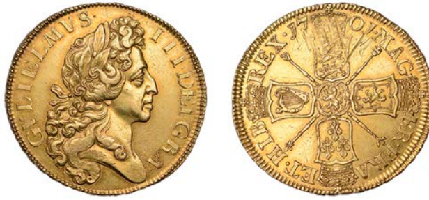
2167 Five Guineas, 1701, 'fine work', second bust, edge DECIMO TERTIO (MCE 172; S 3456). Adjustment marks on reverse, some other minor abrasions and trifling hairlines, otherwise good very fine, rich golden tone over residually lustrous fields £6,000-£8,000