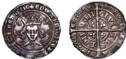
2090 Groat, London, mm. cross pattée, fleurs on all cusps, no saltire after FRANCIE, rev. barred NS in LONDON, double saltire stops, 4.47g/7h (cf. LAL 30/30; N 1286; S 1637). Cabinet tone, good very fine £200-£260