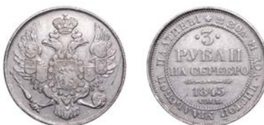
2340 Nicholas I , platinum 3 Roubles, 1843 (KM. C177; F 160). Good fine, very rare