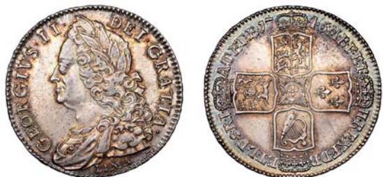
x 2178 Halfcrown, 1746 LIMA, edge DECIMO NONO (ESC 1688; S 3695). Beautifully toned, almost extremely fine