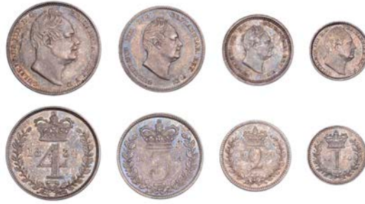
2199 Maundy set, 1834 (ESC 2552; S 3840) [4]. Better than extremely fine, attractive matching tone