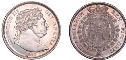
x 2190 Halfcrown, 1817, large head (ESC 2090; S 3788). Lustrous, good extremely fine