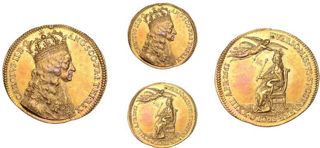
2363 Coronation , 1661, a struck gold medal by T. Simon, crowned bust right, signed ts on truncation, rev. king enthroned, being crowned by Peace, 28mm, 12.28g/12h (MI I, 472/76; E 221). Better than very fine, some surface marks with warm orange tones £3,000-£4,000