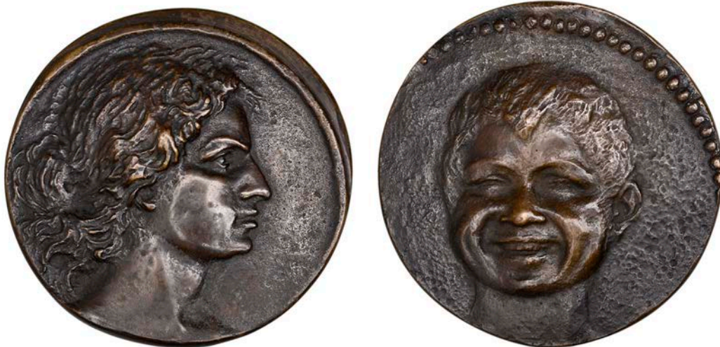
2382 Madre e bambino [Mother and Child], c. 1905, a cast bronze medal by H.Stoltenberg-Lerche, female bust right, rev. smiling face of a boy three-quarters left, 60mm, 107.27g. Very fine and virtually as made, a piece full of character and very much in the style of the antique; unique £80-£100

Provenance: DNW Auction 35, 3 April 1998, lot 716; J.R. Porteous Collection.