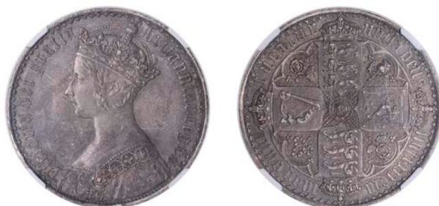
2203 'Gothic' Crown, 1847, edge UNDECIMO (ESC 2571; S 3883). Even grey cabinet tone, good very fine [Graded by NGC as PF 53]