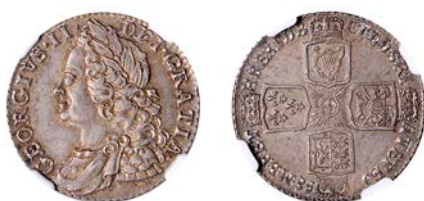
2179 Shilling, 1758 (ESC 1734; S 3704). Prettily toned, good extremely fine [Graded by NGC as MS 64]