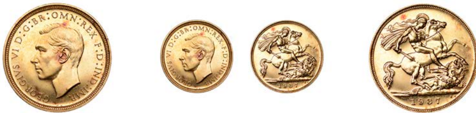
2220 Proof Half-Sovereign, 1937, edge plain, 4.00g/12h (Hill 543A; Bull 1457; S 4077). Very minor clouding to fields, otherwise good extremely fine £700-£900