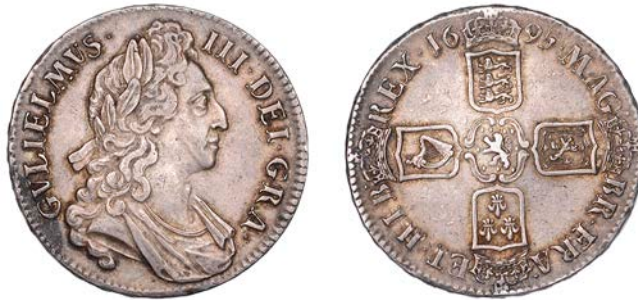
2168 Crown, 1695, first bust, edge SEPTIMO with cinquefoil stops (ESC 990; S 3470). Prettily toned, about extremely fine £200-£300