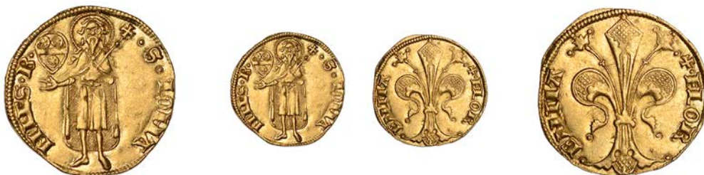
x 2324 Republic , gold Florin, 1414 (I), Jacopo Nasi, St John standing facing, rev. ornate lily, (Bernocchi 2271). Good very fine, rare £1,000-£1,200