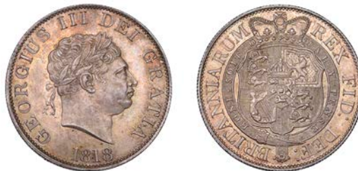
x 2191 Halfcrown, 1818 (ESC 2099; S 3789). Toned over residual lustre, extremely fine