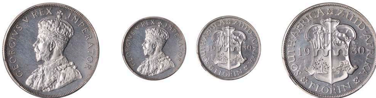
2347 George V, Proof Florin, 1930, Pretoria (Hern S243; KM 18). A superb example with deep reflective fields, practically as struck and extremely rare [Graded by PCGS as PR 64] £2,000-£2,600