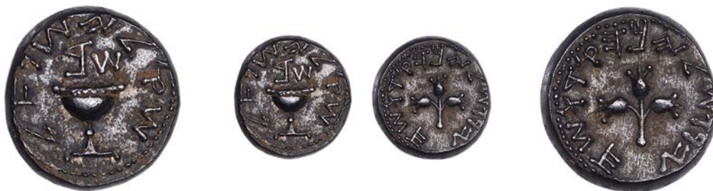
2230 Jewish War , Shekel [Tetradrachm], yr 2 [67-8], 'Shekel (of) Israel' [in Paleo-Hebrew script], chalice with pearled rim, date above, rev. 'Jerusalem (the) holy' [in Paleo-Hebrew script], stem with three pomegranates, 14.25g/12h (Deutsch 1[O1/R1]; Sofaer 5-8; Hendin 1358). Good very fine, well centred, dark toned with trace deposits [Graded by NGC as XF, 4/5, 3/5] £3,000-£3,600