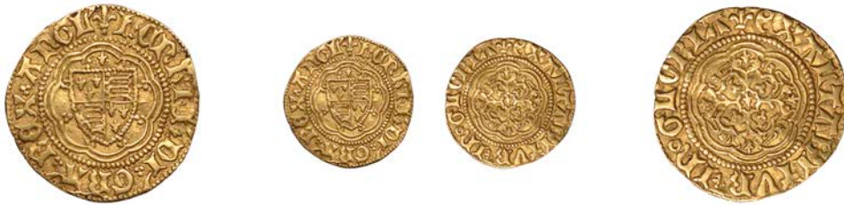
2098 Annulet issue, Quarter-Noble, London, mm. lis, trefoil stops on obv., mullet after EXALTABITVR, 1.68g/4h (Whitton 1; SCBI Schneider 295; N 1420; S 1810). A few edge marks, nearly very fine Provenance: DNW Auction 148, 18-20 September 2018, lot 746; T. Wright Collection £500-£600