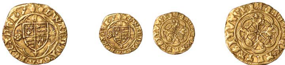
2104 Light Coinage, Quarter-Ryal, type VII, possibly York , mm. lis/crown, rose to left of shield and sun to right, ε above, lis below, no trefoils in spandrels, lis missing from second and third cross ends on rev., reads EXALTABITVR IN GLORI, 1.90g/5h (cf. B & W VII, 15; cf. SCBI Schneider 407-8; N 1560; S 1965). Some surface nicks, otherwise fine and very rare £400-£500

An unlisted variety, possibly associated with York