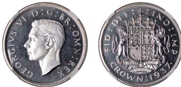
2221 Proof Crown, 1937 (ESC 4021; S 4079). A pleasing example, practically as struck [Graded by NGC as PF 65] £120-£150