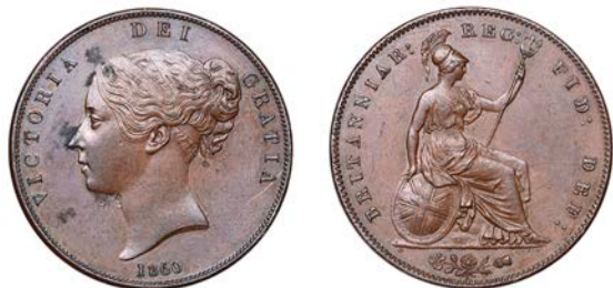
2211 Penny, 1860/59 (BMC 1521; S 3948). Usual flaw under Queen's chin, obverse with some minor staining otherwise about extremely fine, some original lustre, very rare thus