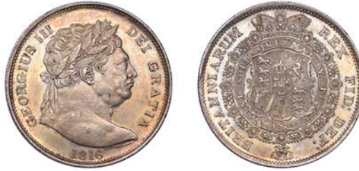
x 2189 Halfcrown, 1816 (ESC 2086; S 3788). Prettily toned with underlying lustre, good extremely fine