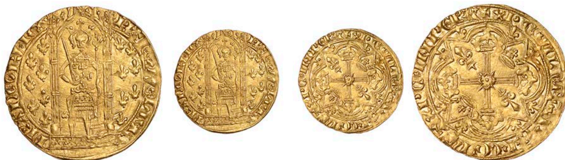
2274 Franc à pied, 3.74g/1h (Duplessy 360; Laf. 371; F 284). Softly struck, otherwise about extremely fine £1,000-£1,500