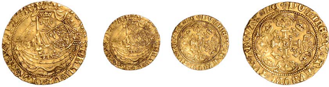
2097 Annulet issue, Half-Noble, London, mm. lis on rev. only, annulet by wrist and in first spandrel on rev., h in centre, 3.46g/12h (Whitton 1; SCBI Schneider 291; N 1417; S 1805). Striking irregularity at 12 o'clock, otherwise very fine with a strong portrait £1,500-£2,000