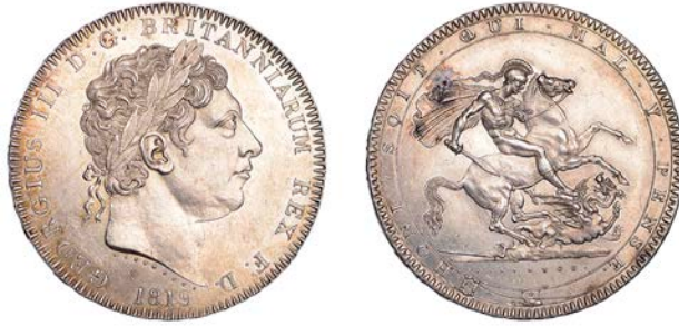
2188 Crown, 1819, edge LUX (ESC 2010; S 3787). Lightly cleaned, otherwise good extremely fine with original lustre