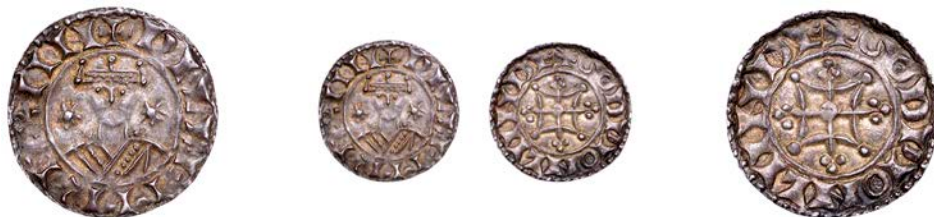
2058 Penny, Two Stars type [BMC V], London , Godwi, GODPI ON LIINDE, reads REX IIN, plain inner circle both sides, 1.23g/9h (Allen 2022, p.178; SCBI Mack, 1381, same dies; BMC 347; N 845; S 1254). Good very fine and toned £800-£1,000

Provenance: Found in Mid-Suffolk in 2014; Spink Auction 230, 5 July 2015, lot 395; T. Wright Collection