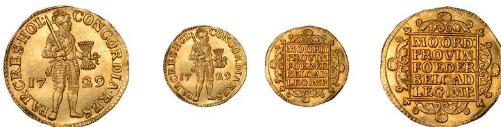
x 2334 HOLLAND, Ducat, 1729, Dordrecht, 3.47g/12h (Delm. 775; Fr. 250; KM 12.2). Lustrous, good extremely fine £800-£1,000 Provenance: J.C. Risk Collection