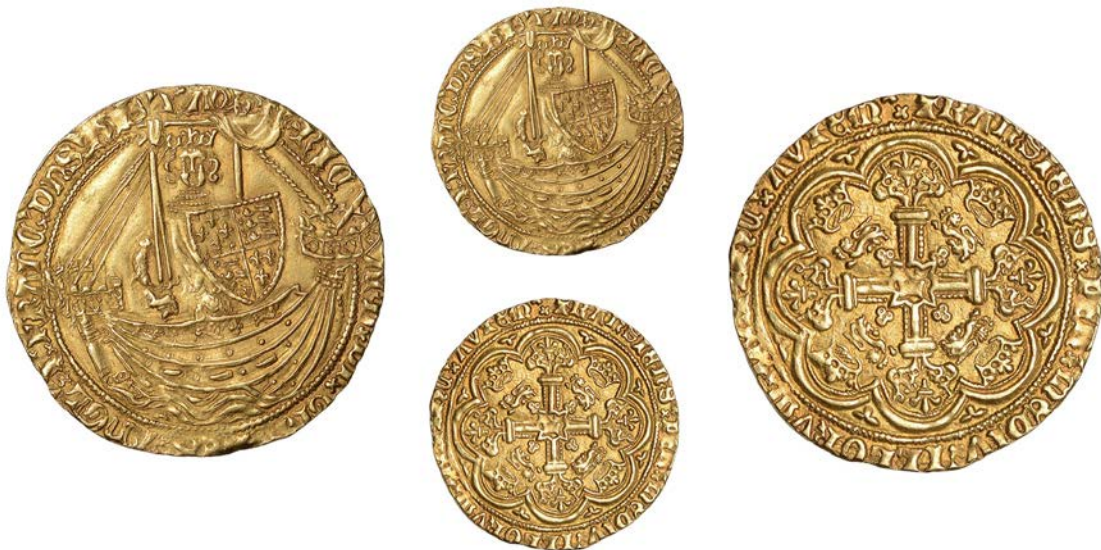
2091 Noble, type 3a, London, mm. cross pattée on rev. only, ropes 3/1, quatrefoils 4/4, no additional marks, 7.77g/6h (cf. SCBI Schneider 160-1; N 1303; S 1656). Struck on a compact but full weight flan, good very fine, beautifully toned £3,000-£4,000