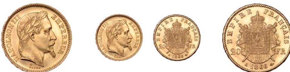
G 2290 20 Francs, 1866A, Paris (Gad. 1062; Fr. 585; KM 801). Lightly clouded fields, good extremely fine Provenance: J.C. Risk Collection