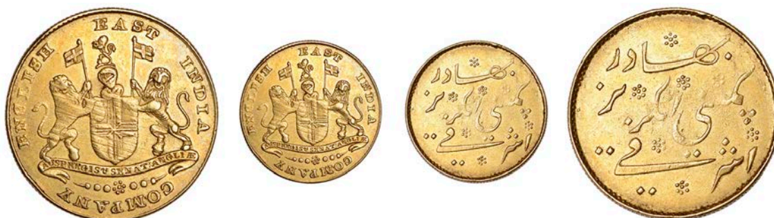
G 2315 Mohur, undated [1819], 11.65g/12h (Prid. 241; F 1587; KM 421.1). Very fine £800-£1,000