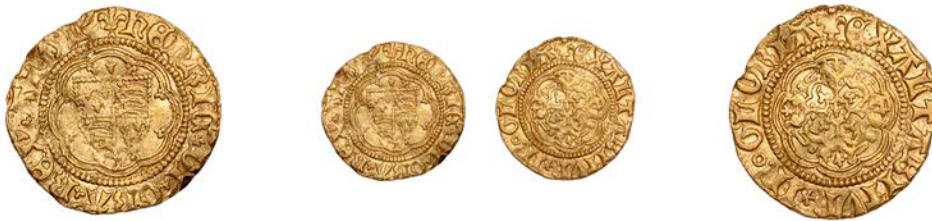
2099 Annulet issue, Quarter-Noble, London, mm. large lis, small lis above shield, trefoil below shield, lis after HENRIC, mullet after EXALTABITVR, annulet after IN, 1.73g/3h (Whitton 3; SCBI Schneider 296; N 1420; S 1811). Light surface scratches and scuffs, otherwise about very fine Provenance: T. Wright Collection £400-£500