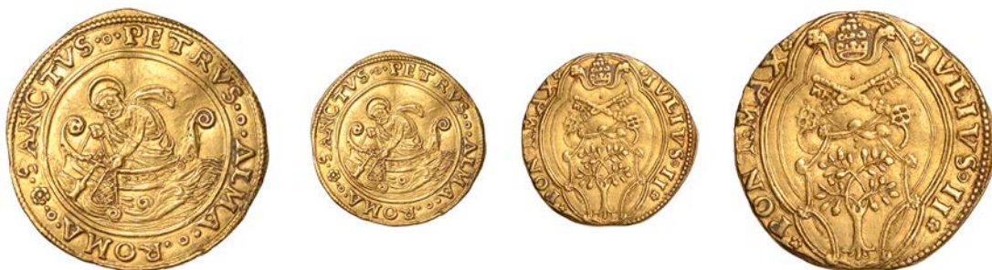
2333 Julius II (1503-1513), 2 Fiorini di camera, 6.74g/8h (Friedberg 41; Berman 560). A bold yellowish gold, about extremely fine and rare £900-£1,200