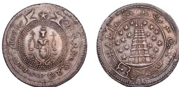
2312 Half-Pagoda, second issue, c. 1808-12, type A/VIII, nine-tiered Gopuram of a temple flanked by 9 stars either side, rev. Vishnu holding sword, rising from lotus flower, Madras, edge grained, 21.04g/12h (Prid. 169; Stevens 3.98; Dav. 247; KM 353). Toned with an even satin patina, good very fine for issue, very rare [Graded by NGC as AU 53] £400-£600