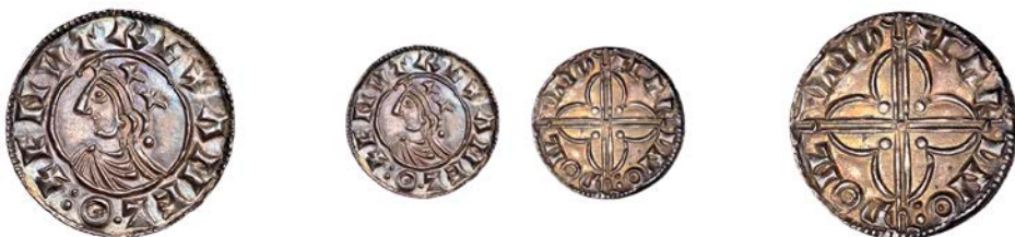
2044 Penny, Quatrefoil type [BMC VIII], London , Eadnoth, EARNOD ON LVND, 0.94g/6h (Hild. 2146; N 781; S 1157). Struck on a lightly undulating flan, otherwise beautifully toned and extremely fine [Graded by NGC as MS 61] £400-£500

Provenance: Found near Horncastle, Lincolnshire; Isladulcie Collection, Spink Auction, 8 July 2020, lot 1543; Collier Collection