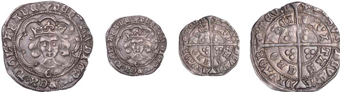
2108 Groat, York, mm. lis, \text{E} on breast, trefoils on cusps including above crown, reads HENRICV' and FRANC, trefoil stops on obv., small lis after FRANC, saltire stops on rev., 3.01g/9h (B & W 2/1; Stewartby p. 432; N 1618; S 2084). Small striking crack, slightly irregular flan, better than very fine, toned, scarce £400-£500

Provenance: R. Carlyon-Britton Collection; Motcomb Collection, Morton & Eden Auction 78, 17 March 2016, lot 125; Wright Collection