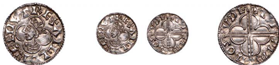
2045 Penny, Quatrefoil type [BMC VIII], Southwark , Ælfweard, ÆLFPERD M'O SVDG, 0.98g/12h (cf. BEH 3388; N 781; S 1157). About extremely fine £300-£400

Provenance: Bt Lockdales, November 2010; T. Wright Collection