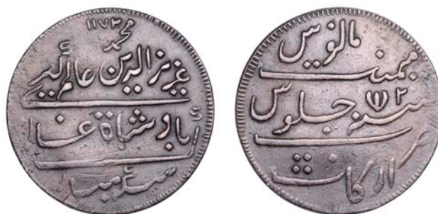
2314 Double-Rupee, AH 1172 (c. 1807-12), type B/II, Arkat, edge grained, 24.35g/12h (Prid. 246; Stevens 3.343; Dav. 248; KM. 404.1). Toned, very fine and very rare [Graded by NGC as VF 30] £300-£400