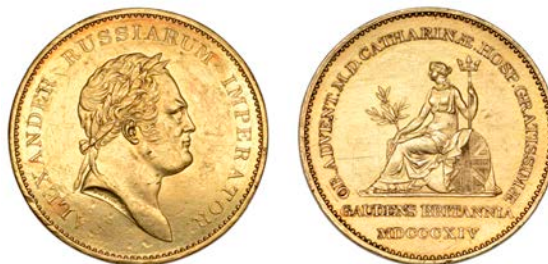
2383 Visit of Alexander I to England and of Catherine, Duchess of Oldenburg, to the Royal Mint , 1814, a gold medal by T. Wyon, laureate bust right, rev. Britannia seated with shield and holding olive spray and trident, 35mm, 28.02g (Diakov 383; BHM 845; Bramsen 1481). Edge and rim nicks, otherwise very fine, extremely rare £3,000-£3,600

Provenance: Baldwin of St James's Auction 58, 27 April 2021, lot 349