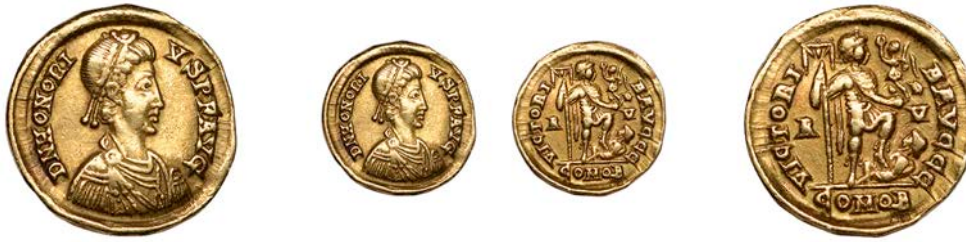
2250 Solidus, Ravenna, 402-6, pearl-diademed bust right, DN HONORI-VS P F AVG around, rev. emperor standing right, holding standard and Victory on globe, left foot on captive, R V in field, VICTORIA AVGGG around, CONOB in exergue, 4.22g/6h (Hoxne 46; RIC 1287d; RCV 20919). Very fine, surfaces lightly rubbed £500-£600