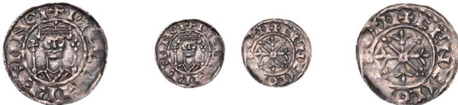
2056 Penny, Two Sceptres type [BMC IV], Thetford , Cyneric, CENRIC O[—]OTFI, 0.93g/12h (Allen 2022, p. 182; Carson 33; BMC 277; N 844; S 1253). Some weakness in legends, otherwise very fine and rare £800-£1,000

Provenance: CNG Triton Auction XVIII, 6 January 2015, lot 1729; T. Wright Collection