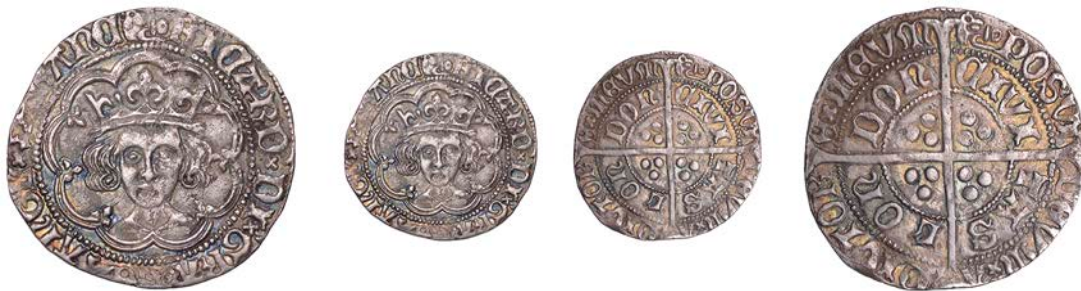
2112 Groat, London, type 2b, mm. boar's head (no. 2), nothing below bust, rev. chevron-barred A in CIVITAS, 2.70g/7h (Winstanley 8; Stewartby p.434, llb; N 1679; S 2156). Some light surface marks, iridescent tone, very fine or better £2,000-£2,600 Provenance: Bt H.J. Berk July 2015; T. Wright Collection