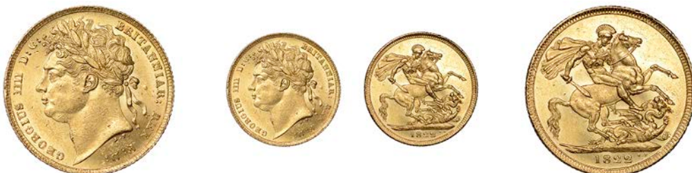
G 2192 Sovereign, 1822 (Hill 5; S 3800). Some bagmarks, otherwise lustrous, extremely fine