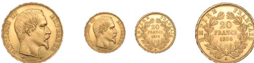
G 2289 20 Francs, 1856A, Paris (Gad. 1061; Fr. 573; KM 781). Lustrous, good extremely fine Provenance: J.C. Risk Collection