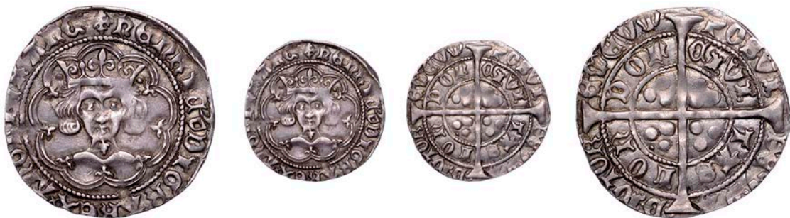
2101 Lis-Pellet issue, Groat, London, mm. cross IIIb on obv. only, lis on neck, pellet either side of crown, mascle after HENRIC, extra pellet below LON and CIVI, no stops after DON, 3.84g/9h (Whitton 84a var.; N 1526; S 1945). Small areas of weakness, otherwise good very fine, toned and very rare Provenance: Ex Walters Collection, 1932; R.C. Lockett Collection, Part III, 4-6 November 1958, lot 3114; Morton & Eden Auction 78, 17 March 2016, lot 78; T. Wright Collection £600-£800