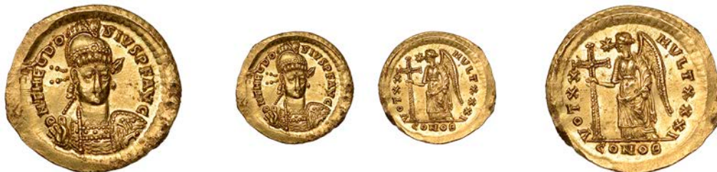
2252 Solidus, Constantinople, 423-25, pearl-diademed, helmeted and cuirassed bust facing slightly right, holding spear and shield, DN THEODO-SIVS P F AVG around, rev. Victory standing left, holding long, jewelled cross; star above, VOT XX MVLT XXXI around, CONOB in exergue, 4.46g/12h (RIC X 225; Depeyrot 75/1). Light scuff on reverse at 8 o'clock, otherwise nearly extremely fine, bright lustrous fields £500-£700