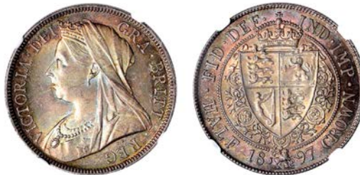
× 2206 Halfcrown, 1897 (ESC 2783; S 3938). Beautifully toned and lustrous, mint state [Graded by NGC as MS 65]