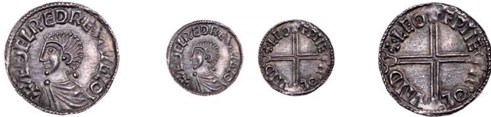
2042 Penny, Long Cross type, London , Leofpine, LEOPFINE MO LVND, 1.64g/12h (BEH –; N 774; S 1151). Ends of long cross a little weak, otherwise about extremely fine with an excellent portrait £300-£400

Provenance: Gemini LLC, Auction IX, 9 January 2012, lot 559; bt Wynyard Coin Center, Sydney Australia, December 1985; T. Wright Collection