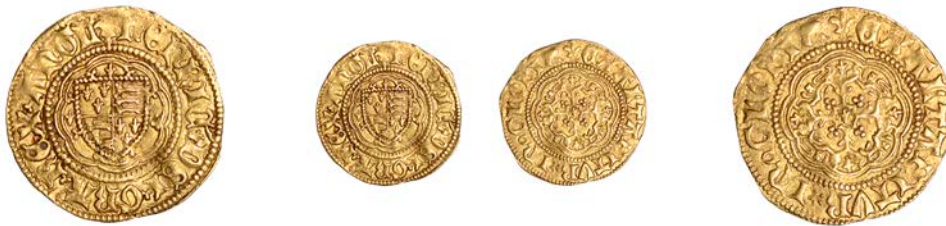
2100 Annulet issue, Quarter-Noble, Calais, mm. large lis, three small lis around shield, reads DEI, 1.73g/1h (Whitton 2; SCBI Schneider --; N 1421; S 1814). On a full flan, softly struck on reverse otherwise very fine £500-£700