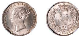
2208 Sixpence, 1866, die 24 (ESC 3213; S 3909). Lustrous, mint state [Graded by NGC as MS 65]