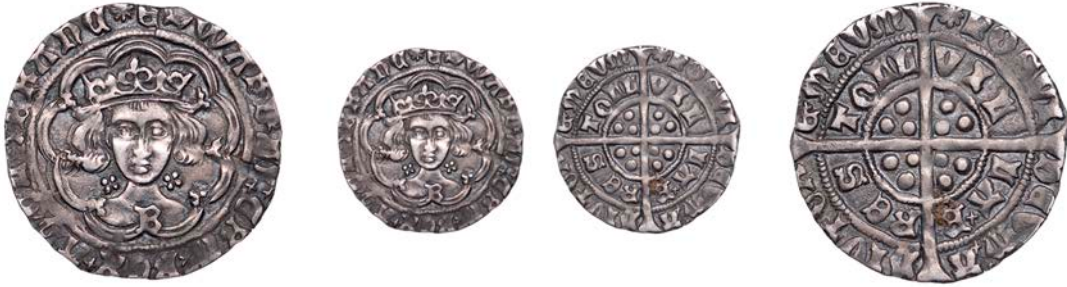
2107 Light coinage, Groat, Bristol, mm. sun, \text{B} on breast, quatrefoils by neck, fleurs on cusps except above crown, reads BRESTOLL, 2.89g/2h (B & W VIa; N 1580; S 2004). Neatly struck, better than very fine, dark tone £200-£260