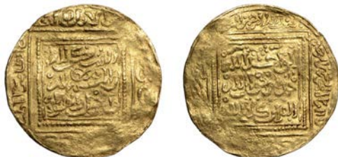
2323 MERINID , Abu Ya'qub Yusuf, Dinar, c. AH 685-706 (AD 1286-1307), 4.68g/12h (Elhradi 24; cf. Album 524; Hazard 645). Struck on an undulating flan with weakness in peripheries, very fine £400-£500