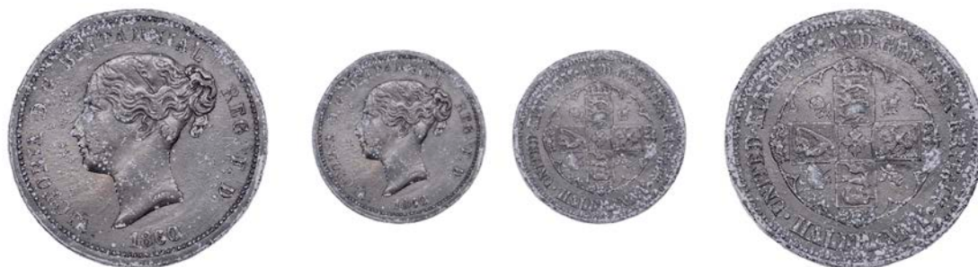
2214 Pattern Halfpenny, 1860, struck in lead by Adolph Weyl, young head left, rev. quartered gothic arms, reads BRITANNIA, edge plain, 11.21g/12h (Pearce, BNJ 2011, p. 195; cf. F 886 R20; cf. BMC 2154). Some verdigris, otherwise good very fine, extremely rare, possibly unique with the legend error