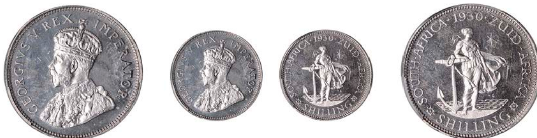
2348 George V, Proof Shilling, 1930, Pretoria (Hern S205; KM 17.2). Lightly toned over deep reflective fields, practically as struck and extremely rare [Graded by PCGS as PR 63] £1,000-£1,500