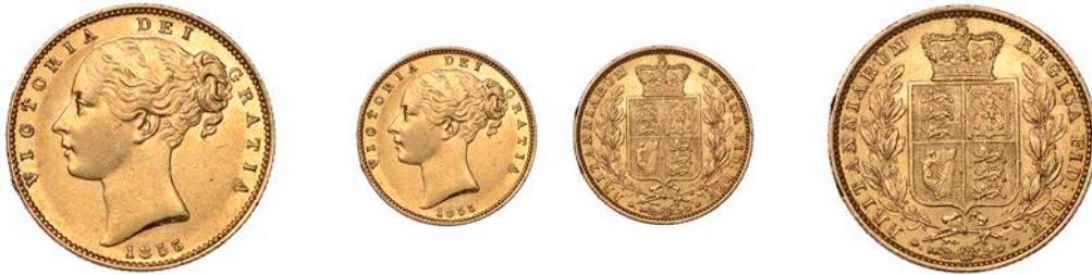
G 2200 Sovereign, 1855, vvw incuse on truncation (Hill 38; S 3852D). Good very fine