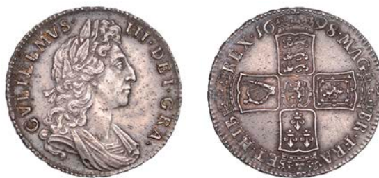
x 2170 Halfcrown, 1698, edge DECIMO (ESC 1034; S 3494). Toned, good very fine Provenance: A.J. Morely Collection, Noble Numismatics, Auction 77, 24th November 2004, lot 825 £200-£260