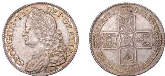
x 2177 Halfcrown, 1746/5 LIMA, edge DECIMO NONO (ESC 1689; S 3695A). Prettily toned, good very fine