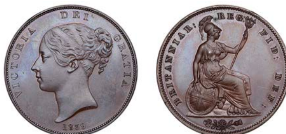
2209 Proof Penny, 1839, in bronzed copper, edge plain, 18.14g/1h (BMC 1479; S 3948). A few trifling marks, otherwise about as struck with an attractive chocolate brown patina