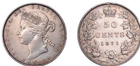
2260 Victoria, 50 Cents, 1871, London (KM 6). Cleaned, otherwise good very fine, scarce