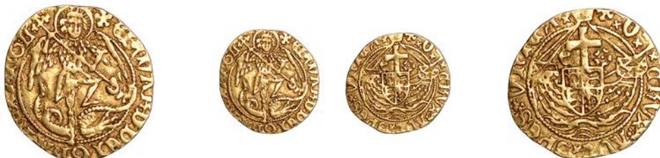
2110 Half-Angel, type XXI, mm. heraldic cinquefoil, Archangel Michael slaying dragon, rev. ship carrying royal arms, cross above flanked by \text{E} and rose, 2.32g/9h (B & W XXI; SCBI Schneider 480; N 1630; S 2093). Good fine for issue, scarce £1,000-£1,500