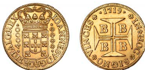
2339 4000 Réis , 1719, Bahia (Bentes 118.06; KM 106). Extremely fine