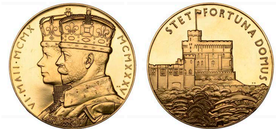
2374 George V, Silver Jubilee, 1935 , a gold medal by P. Metcalfe, conjoined crowned busts of king and queen left, rev. view of Windsor Castle, 57mm, 122.91g (E 2029a; BHM 4249). Fields lightly wiped, otherwise good extremely fine £14,000-£16,000