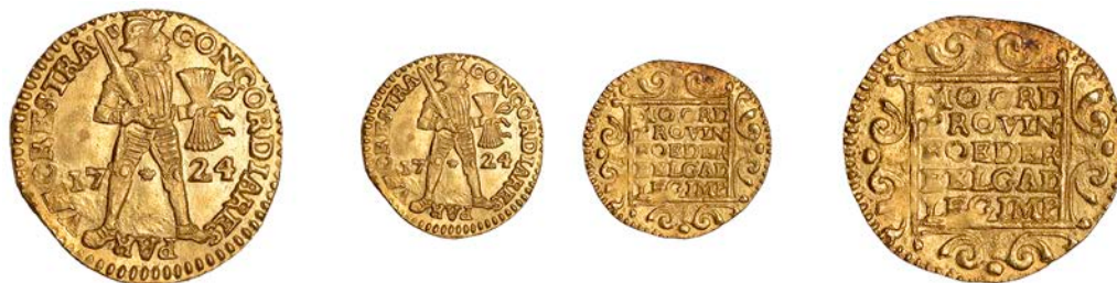
x 2336 UTRECHT, "Akerendam" Ducat, 1724, Utrecht, 3.49g/4h (Delm. 965; Fr. 285; KM 7.4). Struck on an undulating flan, as is normal for type, otherwise extremely fine, scarce £600-£800 Provenance: J.C. Risk Collection