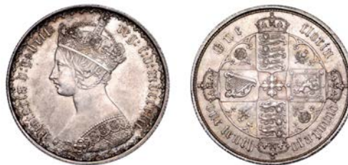
2207 Foin, 1852 (ESC 2820; S 3891). Good extremely fine, residual lustre beneath olive-grey tone [Graded by NGC as MS 62]