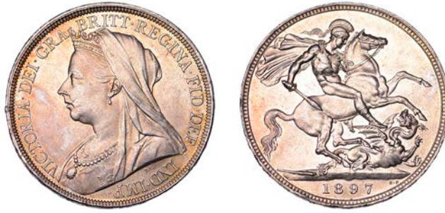
2204 Crown, 1897, edge LXI (ESC 2602; S 3937). Lightly toned with lustrous, prooflike fields, good extremely fine