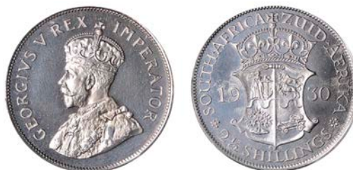
2346 George V, Proof Halfcrown, 1930, Pretoria (Hern S281; KM 19.2). A superb example with deep reflective fields and a strong cameo; practically as struck and extremely rare [Graded by PCGS as PR 64] £3,000-£4,000