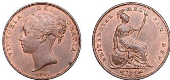
2210 Penny, 1847, far colon (BMC 1493; S 3948). Better than extremely fine, much original colour