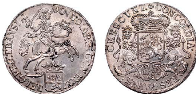
x 2335 OVERIJSEL, Ducaton, 1734, Kampen (Dav. 1829/30; Del. 1036; KM 80). Lightly toned with residual mint bloom, extremely fine or better £150-£200 Provenance: J.C. Risk Collection; Recovered from the shipwreck of the Dutch East Indiaman 't Vliegende Hart, sunk in 1735 off the port of Fort Rammekens, Dutch East Indies.