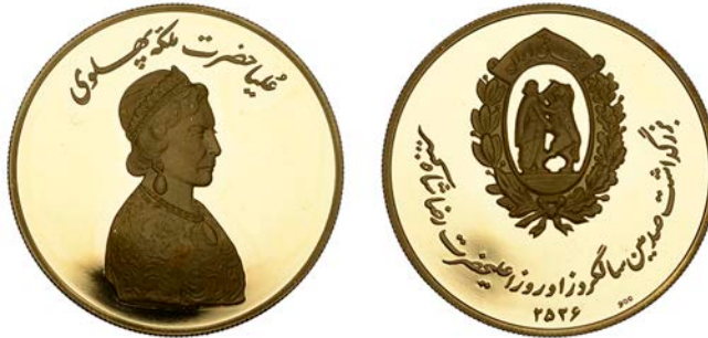
2381 Tadj ol-Molouk Pahlavi , MS 2535 (1976/7), a .900 gold medal, crowned bust right, rev. Zoroastrian arms, 40mm, 30.23g. As struck £2,600-£3,000