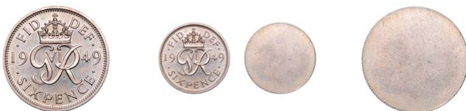
2222 Proof Sixpence, 1949, a uniface rev. die trial, edge milled, 2.79g (cf. ESC 4271; S 4110). A superb example, lightly toned but otherwise practically as struck, extremely rare - 1 of only 6 examples struck £1,000-£1,200