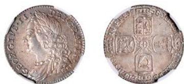
2181 Sixpence, 1758 (ESC 1763; S 3711). prettily toned and lustrous, good extremely fine [Graded by NGC as MS 64]