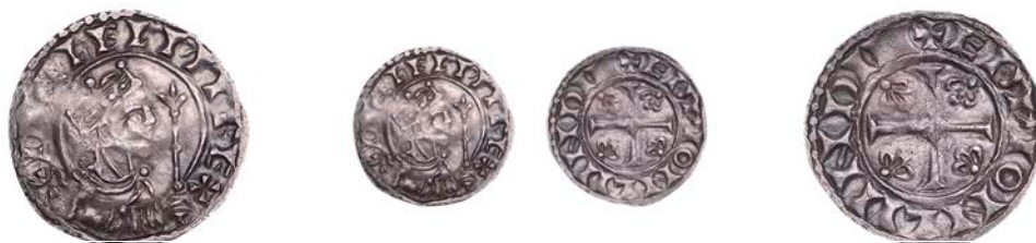
2060 Penny, Profile Right type [BMC VII], London , Eadwi, EDPI ON LIINDNI, 1.20g/3h (Allen 2022 p.178; cf. BMC 464; SCBI Stockholm 1304; N 847; S 1256). A few light marks, good fine, dark toned £500-£600

Provenance: DNW Auction 142, 13-15 September 2017, lot 91; T. Wright Collection