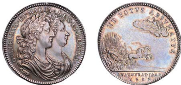
x 2364 William and Mary, Coronation , 1689, a silver medal, unsigned [by J. Roettiers], conjoined busts right, rev. Jove hurling a thunderbolt at Phæton who is falling from his chariot, 35mm, 16.53g (MI I, 662/25; E 312). Nearly extremely fine, attractively toned £300-£400