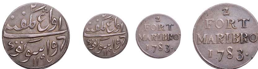
The Highest Graded Awarded by NGC

2355 Fort Marlbro, 2 Sukus, AH 1198 (1784 AD), Calcutta mint, for circulation in Fort Marlborough, Bengkulu, 12.74g/8h (Prid. 2; KM 271). Very fine for issue, very rare [Graded by NGC as VF 35] £1,200-£1,500