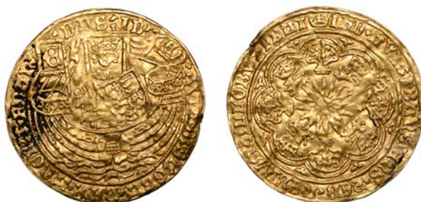
2103 Light coinage, Ryal, 16th century imitation, Gorinchem, Gp. II, class 2, mm. crown on rev. only, trefoil stops, fleurs in spandrels, 7.56g/10h (SCBI Schneider 851; N p.85, note; S 1952). Very fine, full flan £1,500-£2,000

An unusual misspelling, usually found on Ryals of Bristol, Norwich and Coventry.