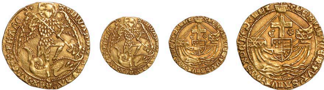
2109 Angel, type XXI, mm. heraldic cinquefoil, Archangel Michael slaying dragon, rev. ship carrying royal arms, cross above flanked by \text{E} and rose legend ends REDEMP'T', 5.15g/9h (B & W XXI, 1; cf. SCBI Schneider 467-8; N 1626; S 2091). A little weak on the Angel's face, otherwise very fine and toned £1,500-£1,800