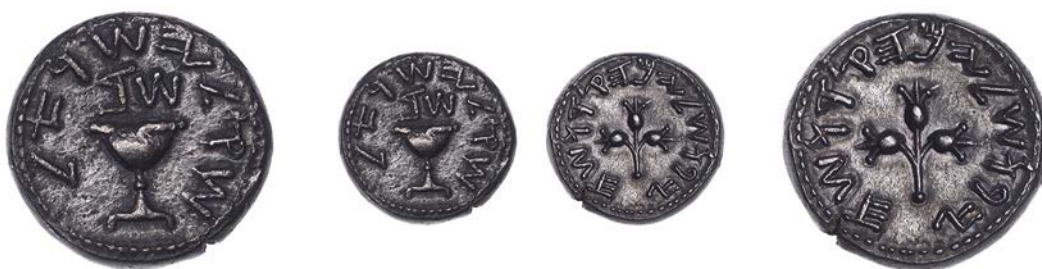
2231 Jewish War , Shekel [Tetradrachm], yr 2 [67-8], 'Shekel (of) Israel' [in Paleo-Hebrew script], chalice with pearled rim, date above, rev. 'Jerusalem (the) holy' [in Paleo-Hebrew script], stem with three pomegranates, 13.18g/1h (Deutsch 174 [O12/R166]; Sofaer 5-8; Hendin 1358). Good very fine, well centred, dark toned with minor scratches [Graded by NGC as XF, 5/5, 2/5] £3,000-£3,600