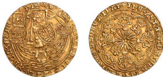
2102 Light Coinage, Ryal, type VIIIa, London, mm. crown on rev. only, king in ship of state, pellet below shield, reads FRNC, rev. radiate sun with rose at centre, small trefoils in spandrels, 7.67g/12h (SCBI Schneider –; N 1549; S 1951). Very fine, well struck up, warm orange toning £2,400-£3,000

An unusual misspelling, usually found on Ryals of Bristol, Norwich and Coventry.