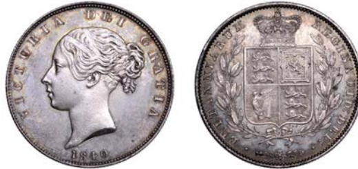
2205 Halfcrown, 1840 (ESC 2715; S 3887). Good extremely fine, attractive grey tone over much residual lustre [Graded by NGC as MS 62]