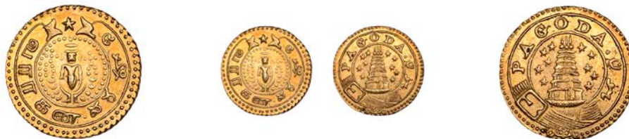
2311 Pagoda, second issue, c. 1808-15, type F/I, seven-tiered Gopuram of a temple flanked by 5 stars either side, rev. Vishnu holding sword, rising from a lotus flower, pellet between legends, edge grained, 2.99g/12h (Prid. 148; Stevens 3.36; F 1583; KM 356). Lustrous, extremely fine [Graded by NGC as AU 58] £400-£500