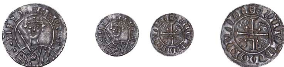
2059 Penny, Sword type [BMC VI], Wallingford , Brand, BIIRAND ON PILN, 1.26g/3h (Allen 2022 p.182; Drabble 590, same dies; N 846; S 1255). Obverse legend partly weak, otherwise good very fine and toned, very rare £1,000-£1,500

Provenance: DNW Auction 142, 13-15 September 2017, lot 91; T. Wright Collection