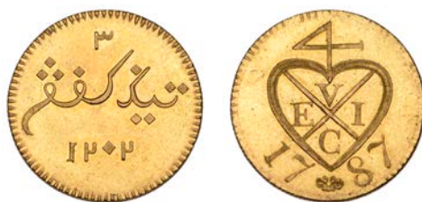
The Joint Highest Graded Example

2353 British Sumatra, Proof Three Kepings, 1787 (AH 1202), in gilt-copper, Soho mint, 9.75g/6h (Prid. 7b; KM 259.1). Lustrous, practically as struck, rare [Graded by NGC as PF 63 Cameo] £800-£1,000