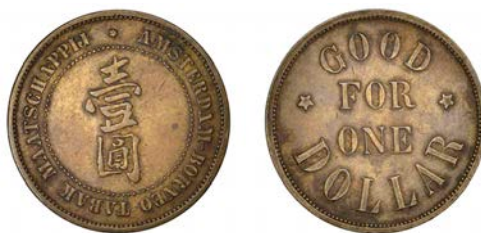
2337 MARIENBERG, Amsterdam-Borneo Tabak Maatschappij , brass Dollar, 29mm (Lansen/Wells 608; Scholten 1014; cf. Lyall Sale, 100). Very fine, rare £100-£150