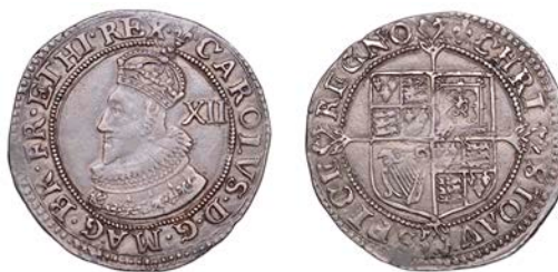
2150 Tower mint, Shilling, Gp A, mm. lis [1625], bust 2, 5.67g/9h (Sharp A2/1; SCBI Brooker 385-9; N 2216; S 2782). On a full round flan, very fine with an attractive tone £300-£400