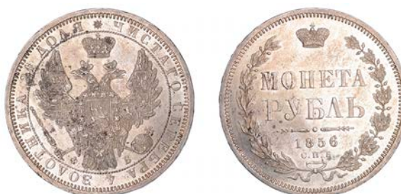
2341 Nicholas I or Alexander II , Rouble, 1855 СРБ HI, St. Petersburg (Bitkin 235; KM C.168.1). Some light deposits on reverse, otherwise lustrous, extremely fine £500-£700