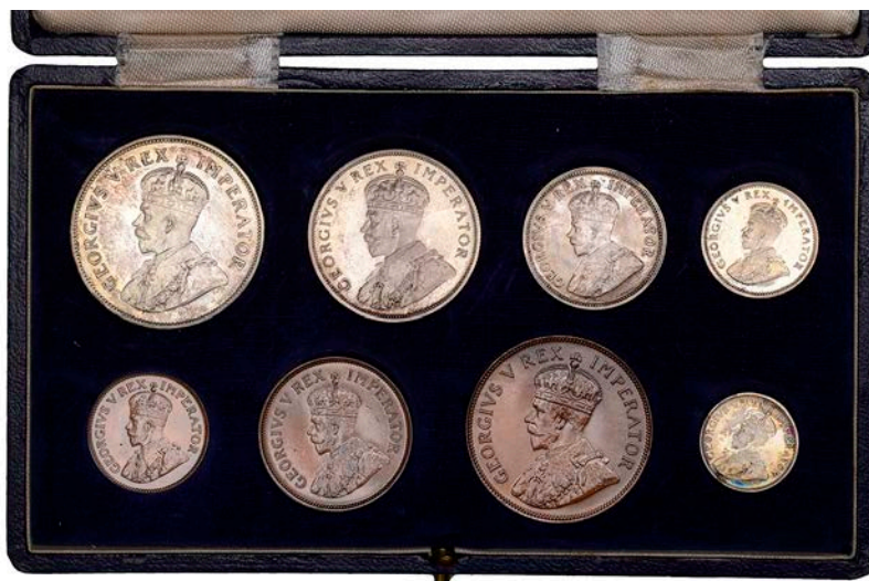
2345 George V, Proof Set, 1931, comprising Halfcrown to Farthing (Hern P7; KM PS6) [8]. All lightly toned, otherwise as about as struck and attractive, very rare; in original blue leather case of issue £6,000-£8,000