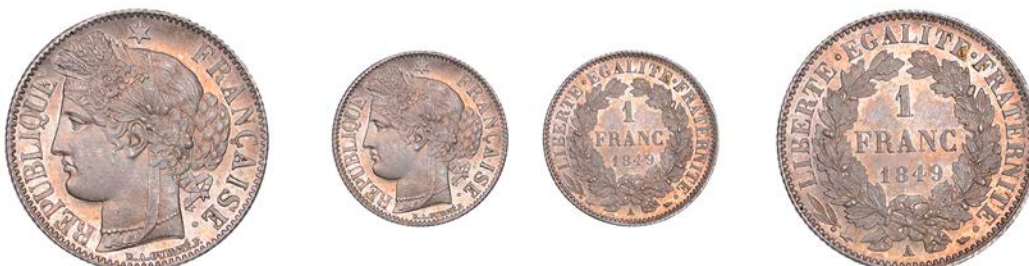
2288 Franc, 1849A, Paris (Gad. 457; KM 759.1). Toned, extremely fine [Graded by NGC as MS 65]