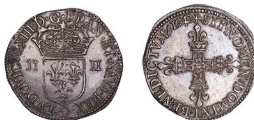
× 2276 Quarter-Écu, 1642G, mm. sheaf, Poitiers, 9.65g/9h (Dupl. 1332b; Gad. 28). Cabinet tone, signs of overstriking, nearly extremely fine, scarce £150-£200 Provenance: J.C. Risk Collection