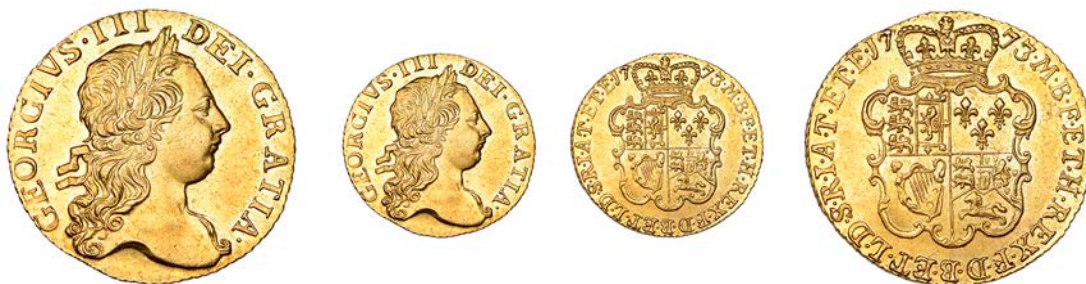
x 2182 Guinea, 1773, third bust (EGC 684; MCE 378; S 3727). Some very light hairlines, otherwise a lustrous and pleasing example, extremely fine or better, very rare thus £1,500-£2,000