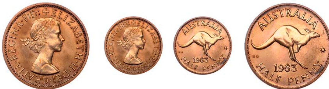
2259 Elizabeth II, Proof Halfpenny, 1963, Perth (KM 61). Practically as struck, rare