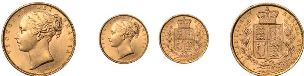
G 2202 Sovereign, 1871, die no. 50 (Hill 55; S 3853B). Lustrous, about mint state