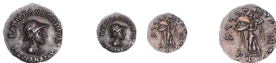
2233 Menander Soter (155-130), Drachm, draped bust right wearing cavalry helmet decorated with royal diadem, ΒΑΣΙΛΕΥΣ ΣΩΤΗΡΙΟΣ ΜΕΝΑΝΔΡΟΥ around, rev. Athena Alkidemos advancing left, holding shield and brandishing thunderbolt, monogram in field, 2.37g/12h (Bopearachchi 16D). Almost extremely fine, attractive dark tone with iridescent highlights £90-£120