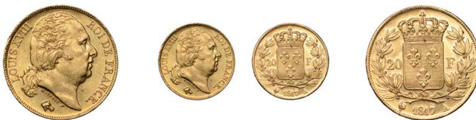
G 2287 20 Francs, 1817A, Paris (Gad. 1028; Fr. 519; KM 712). Lustrous, good extremely fine Provenance: J.C. Risk Collection