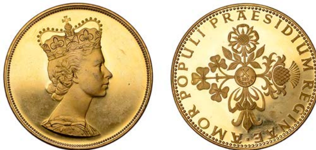
x 2375 Visit of Elizabeth II to Germany, 1965 , a .980 gold medal by the Munich Mint, crowned bust right, rev. foliate of thistle, rose, shamrock and leek, 40mm, 34.88g (W&E 8398 var.). Lightly clouded fields, otherwise good extremely fine, rare £4,000-£5,000