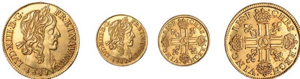
× 2275 Louis d'Or, 1641A, à la mèche longue, Paris (Gad. 57; Dupl. 1298, Fr. 410; KM 104). About extremely fine, residually lustrous and attractive £1,200-£1,500 Provenance: J.C. Risk Collection