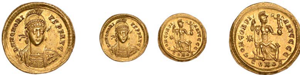
2251 Solidus, Constantinople, 5th Officina, 403-8, pearl-diademed, helmeted and cuirassed bust facing front, holding spear in right hand behind head and shield decorated with horseman on left arm, D N HONORI-VS P F AVG around, rev. Constantinopolis, helmeted and draped, enthroned, facing front, head right, holding sceptre in right hand and Victory on globe in left hand, right foot on prow, star in left field, CONCORDIA AVGGG E around, CONOB in exergue, 4.47g/5h (RIC X Arcadius 30). About very fine [Graded by NGC as AU, Strike 3/5, Surface 2/5, scratches, edge marks, die shift] £400-£600