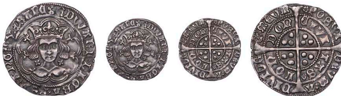
2105 Heavy coinage, Groat, London, class III, mm. rose, quatrefoils by neck, small trefoil on breast, eye after TAS, saltire stops, none in inner legend, 3.98g/5h (B & W Ille var.; N 1532; S 1974). Nearly extremely fine, dark tone, rare £300-£400

An unlisted variety, possibly associated with York