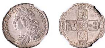
2180 Sixpence, 1757 (ESC 1762; S 3711). Light cabinet tone with much lustre, good extremely fine [Graded by NGC as MS 63] £150-£200