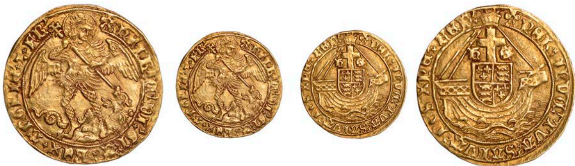
2114 Angel, type IIIc, mm. pansy (with long curving lower petals, obv.) [1495-98], Archangel Michael slaying dragon, reads ANGLIE Z FR, rev. ship bearing royal arms, cross above flanked by H and rose, reads CRVC and RED, saltire stops, 5.08g/8h (Lockett 1680, same dies; SCBI Schneider 520-21; N 1696; S 2183). About extremely fine £3,000-£4,000

The rose placed to the right of the cross on the reverse appears to have been puncheoned over a letter, quite possible an E. There are several reverse dies for mm. pansy which carry this error (see also DNW 137/1110).