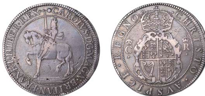
2151 Briot's First Milled issue [1631-2], Crown, mm. daisy on obv. only, signed B both sides, tall horseman left, CAROLVS DG MAGN BRITAN FRAN ET HIBER REX around, rev. crowned and garnished shield of arms, CHRISTO AVSPICE REGNO around, 28.65g/6h (SCBI Brooker 714, same dies; Locektt 2349; N 2298; S 2852). Good fine, old cabinet tone £1,500-£1,800