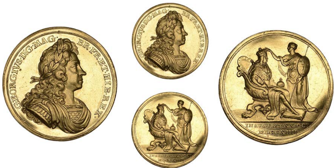
x 2365 George I, Coronation , 1714, a gold medal by J. Croker, laureate bust right, rev. Britannia crowning King, 34mm, 22.09g (MI II, 424/9; E 470). Slightly wavy flan, a few surface marks, otherwise about extremely fine £5,000-£7,000