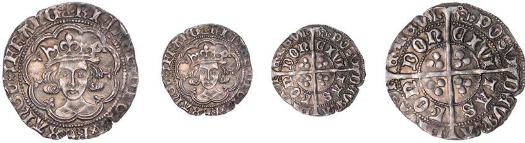
2111 Groat, London, type 2b, mm. boar's head (no.2), nothing below bust, rev. barred a in civitas, 2.89g/1h (Winstanley 7; N 1679; S 2156). A field find with some irregularity along the lower the edge, otherwise good very fine, the portrait reverse mint mark well struck up £2,000-£2,600