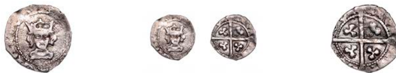
2113 Halfpenny, London, mm. sun and rose, type 3, small face, almond-shaped eyes, 0.41g/7h (Withers IV 1a; N 1688; S 2171). Good fine, clear portrait, very rare £300-£400