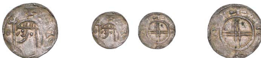
2338 Olav III Kyrre (1066-1093), Penning, uncertain mint. degraded helmeted bust left, sceptre or staff before, rev. short voided cross, symbols replace legends, 1.23g (Schive IIIb, 35). About very fine for this crude issue, very rare £400-£600