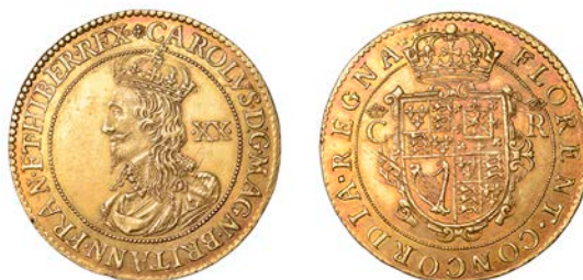
2149 Briot's First Milled Issue [1631-2], Unite, mm. flower on obv. only, signed B both sides, draped and crowned bust left, rev. crowned and quarter shield of arms, 9.09g/6h (SCBI Schneider 273, same dies; SCBI Brooker 706, same dies; N 2294; S 2719). Extremely fine, the fields lightly hairlined but residually lustrous and bright, rich orange toning £10,000-£12,000

Provenance: Bt AMR Coins, October 2011; T. Wright Collection