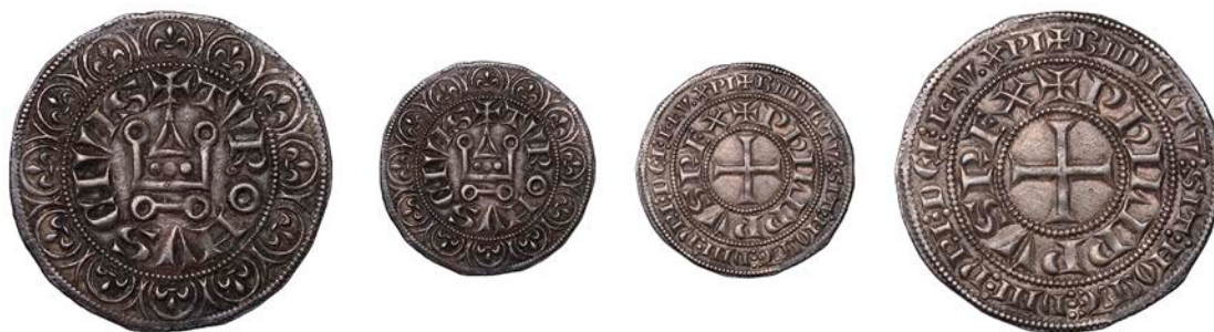
× 2273 Gros tournois à l'O rond, 4.10g/11h (Dupl. 213). Neatly struck on a full flan, nearly extremely fine and toned £150-£180 Provenance: J.C. Risk Collection