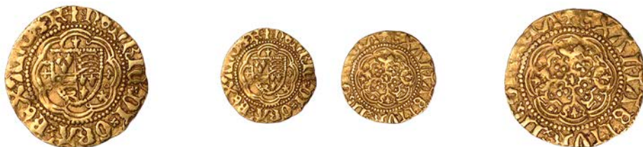
2092 Definitive issues, Quarter-Noble, class C, mm. pierced cross, lis above and quatrefoils either side of shield, cinquefoil below to right, annulets at points of tressure, 1.75g/9h (SCBI Schneider 224, same obv. die; Stewartby p.322, class Bb*; N 1382; S 1755). Good fine and rare £700-£900