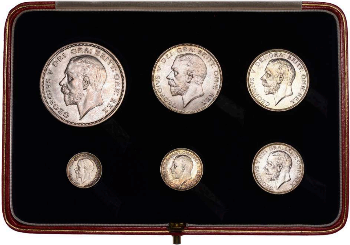
2219 Proof Set, 1927, comprising Crown to Threepence [6]. Lightly toned, as struck; in original red leather case of issue £200-£260