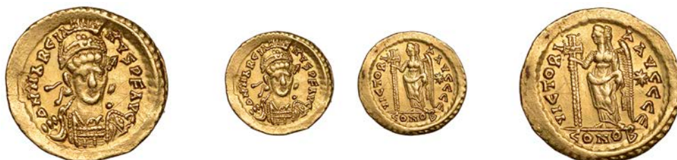
2253 Solidus, Constantinople, 450-57, 5th officina, pearl-diademed, helmeted and cuirassed bust facing slightly right, holding spear and shield, DN MARCIA-NVS P F AVG around, rev. Victory standing left, holding long, jewelled cross, star in right field, VICTORI-A AVGGG E around, CONOB in exergue, 4.44g/5h (RIC X 510; Depeyrot 87/1). Light graffiti in fields, good very fine, some residual lustre £500-£700