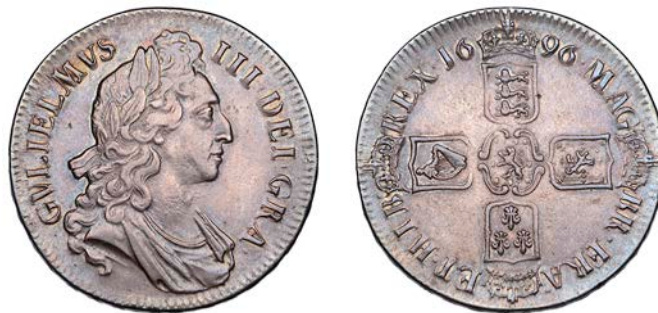
x 2169 Crown, 1696, first bust, edge OCTAVO (ESC 995; S 3470). Prettily toned, good very fine Provenance: J.C. Risk Collection £200-£260