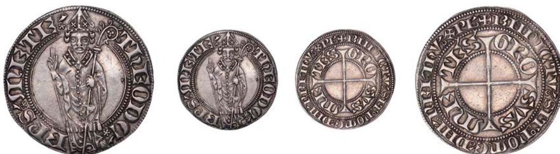
x 2291 METZ, Thierry de Boppart (1365-84), Gros, bishop standing facing holding crozier, rev. cross within double inscription, 3.35g/3h (Boudeau 1641). Good very fine, lightly toned