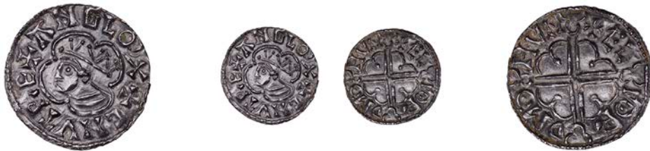
2043 Penny, Quatrefoil type [BMC VIII], Huntingdon , Æthelweard, +ÆLPORD MO HVN, struck from dies of Bedford style, 0.97g/10h (Blackburn & Lyon p. 240; Eaglen p. 113, Ca [an unrecorded die pairing]; N 781; S 1157). Almost extremely fine, handsome dark tone, very rare thus £500-£700

Provenance: Found near Horncastle, Lincolnshire; Isladulcie Collection, Spink Auction, 8 July 2020, lot 1543; Collier Collection