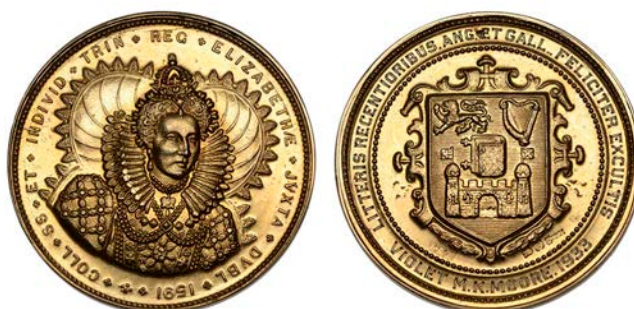
2373 Trinity College, Dublin , a gold award medal by West & Son, bust of Elizabeth I three-quarters right, rev. & arms, named (Violent M.K. Moore, 1933), 40mm, 14ct, 27.32g. A pleasing example with only a minute nick at 12 o'clock on obverse, otherwise good extremely fine' in original maroon gilt-blocked fitted case of issue £2,000-£3,000