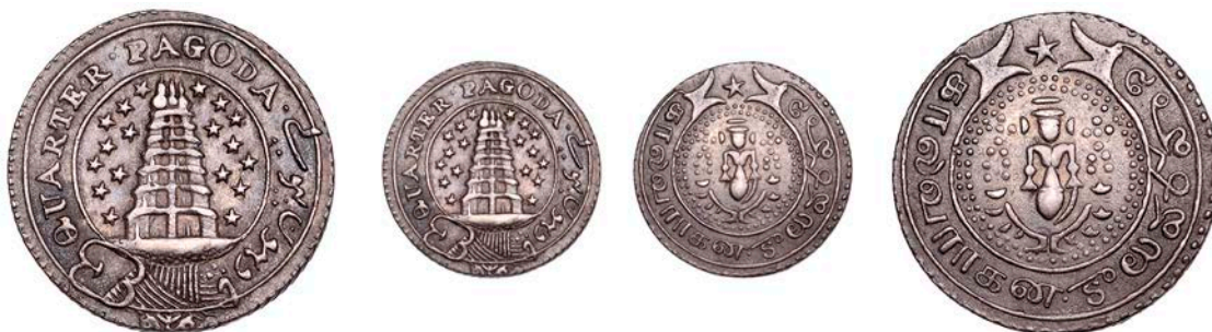
2313 Quarter-Pagoda, second issue, c. 1808, type P/XIV, seven-tiered Gopuram of a temple flanked by 9 stars either side, rev. Vishnu holding sword in left hand, rising from a lotus flower, Madras, edge grained, 10.45g/12h (Prid. 176; Stevens 3.199; KM 352). Toned, good very fine [Graded by NGC as X] £200-£300