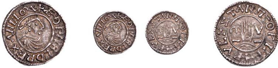
2041 First Hand type, Winchester , Wulfstan, PVLSTAN MO PIN, 1.58g/9h (Winchester 189 var. [bust right]; BEH –; N 766; S 1144). Weakly struck, otherwise good very fine and toned £300-£400

Provenance: Gemini LLC, Auction IX, 9 January 2012, lot 559; bt Wynyard Coin Center, Sydney Australia, December 1985; T. Wright Collection