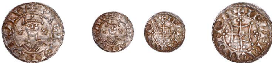
2057 Penny, Two stars type [BMC V], Ipswich , Aelfric, AELFRIC ON GIP, 1.26g/9h (Allen 2022, p.176; Sadler 847a, this coin ; SCBI Ashmolean 81; N 845; S 1254), Good very fine with residual die striations, dust brown patina, rare £1,500-£1,800

Provenance: CNG Triton Auction XVIII, 6 January 2015, lot 1729; T. Wright Collection