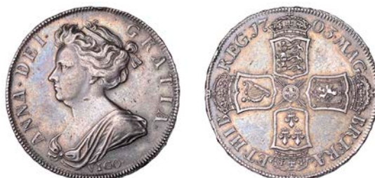
x 2171 Halfcrown, 1703 VIGO, edge TERTIO (ESC 1358; S 3580). Good very fine, dark toned, marks £200-£260