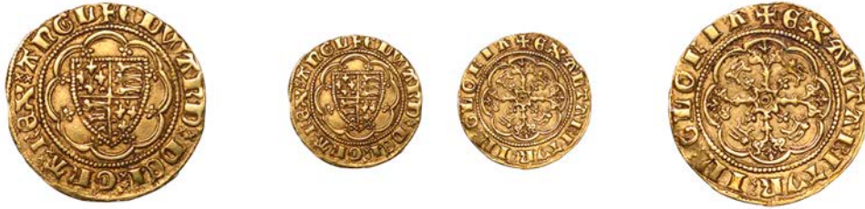
2089 Treaty period, Quarter-Noble, Calais, Group B, mm. cross 3, EDWARD DEI GRA REX ANGL, curule X, rev. EXALTABITVR IN GLORIA, annulet in centre, 1.88g/1h (LAL 1; Doubleday 274; SCBI Schneider –; N 1245; S 1512). Very fine and toned £500-£600