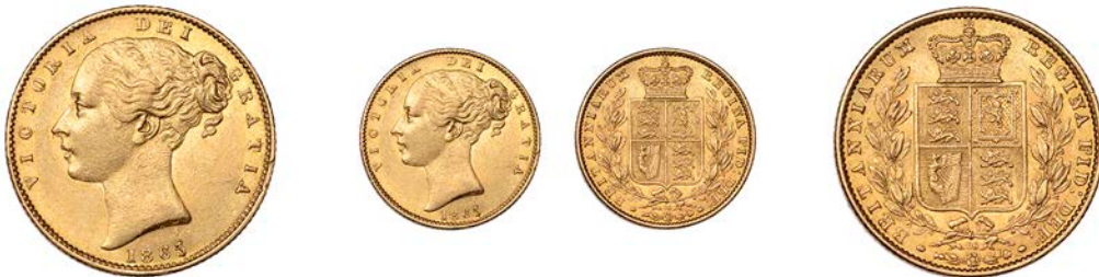
G 2201 Sovereign, 1865, die no. 16, die of 5 broken in date (Hill -; S 3853). Good very fine