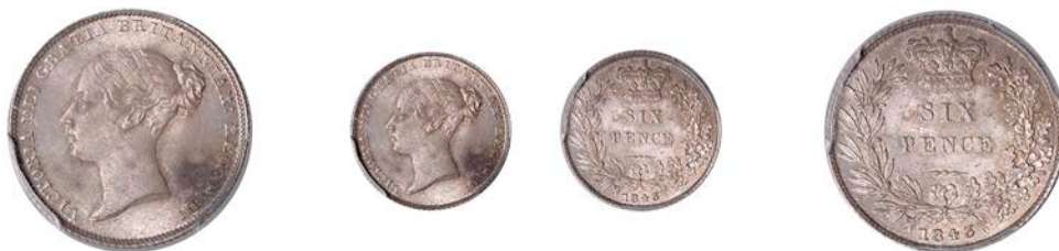
214 Sixpence, 1843 (ESC 3176; S 3908). Lightly toned over lustrous fields, mint state [Graded by PCGS as MS 65+]