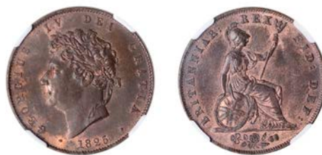
199 Halfpenny, 1825 (BMC 1431; S 3824). Extremely fine, a little original colour [slabbed NGC MS 64 RB]

Provenance: Heritage MBS 231739, 28 September 2017 (64223)