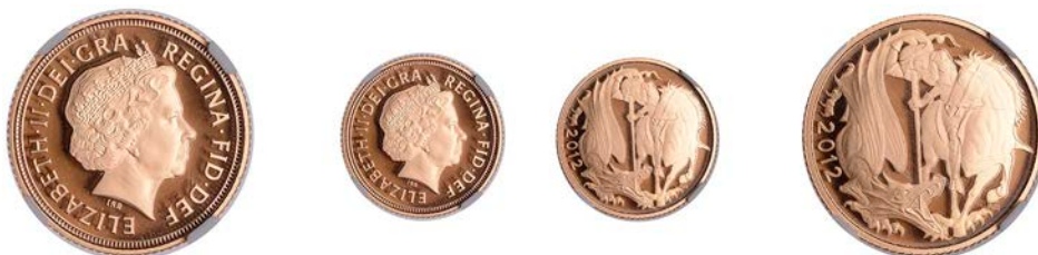
G 241 Proof Half-Sovereign, 2012, Diamond Jubilee (Marsh 558A; S SB8). As struck [Graded by NGC as PF 70 Ultra Cameo] £500-£600