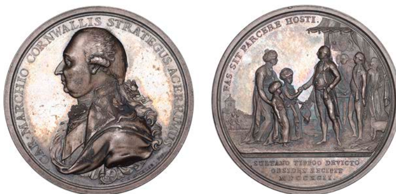
318 Defeat of Tipu Sultan, 1792 , a silver medal by C.H. Küchler, uniformed bust of Marquis Cornwallis left, rev. Cornwallis receives the sons of Sultan Tipoo as hostages, 48mm, 60.44g (Pudd. 792.1.1; BHM 363; E 845). Good extremely fine, beautifully toned over prooflike fields; a superb medal £2,000-£2,600

One of the rarest of Masonic medals, struck in November 1772, in an edition of 40, for master masons of the lodge, for a fee of half a guinea (10s 6d ) The Alfred Lodge, for members of Oxford University, was in existence from 1769 - 1790.