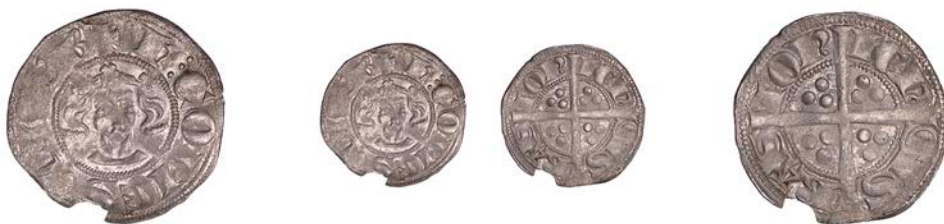
269 LUXEMBURG, Henry IV (1288-1309), Esterlin, Bastogne, rev. BAS TON IEN SIS, 0.93g/4h (Mayhew 109 var.). Small edge chip, good fine, extremely rare, the reverse legend unpublished £300-£400