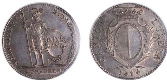
284 LUCERNE, Republic, 4 Franken, 1814, Lucerne (HMZ 668; KM 109). Prettily toned, extremely fine [Graded by PCGS as MS 61] £600-£800