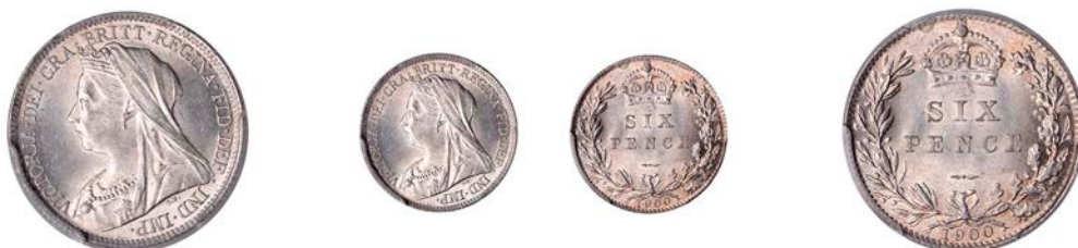
215 Sixpence, 1900 (ESC 3293; S 3941). Lustrous, mint state [Graded by PCGS as MS 65+]