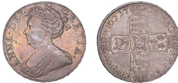
166 Crown, 1708, second bust, edge SEPTIMO (ESC 1346; S 3601). Toned, good very fine