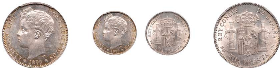
282 Alfonso XIII, Peseta, 1899 SGV , Madrid (Cal. 42; KM 706). Lustrous, good extremely fine [Graded by PCGS as MS 64] £100-£120