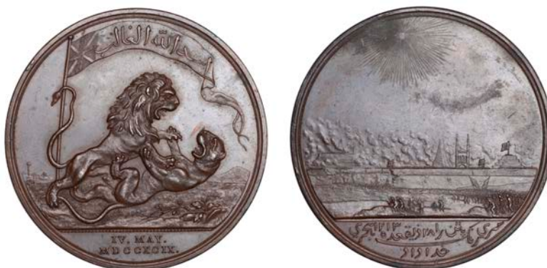
324 Siege and Capture of Seringapatam, 1799 , a copper medal by C.H. Küchler, lion right, subduing tiger, rev. fortress under attack, 48mm, 40.53g (Pollard 20; E 903). Some light marks, nearly extremely fine £150-£200

Provenance: A Collection of Medals relating to C. Cornwallis, 1st Marquis.