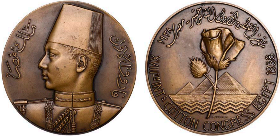
360 XVIII International Cotton Congress, Cairo, 1938 , a bronze medal by P. Metcalfe and P. Turin, bust of Farouk in fez left, rev. cotton flower, pyramids in background, 72mm, 155.33g (Van Daele 204; cf. DNW 132, 1702). Extremely fine, rare; in original maroon gilt-blocked fitted case £400-£500