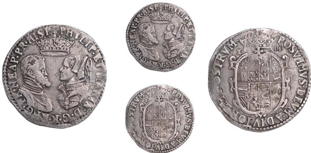
138 Shilling, undated, full titles and mark of value, 5.87g/9h (BM 1935,0401.1982, same obv. die; N 1967; S 2498). About very fine, the portraits better and quite clear, light grey tone