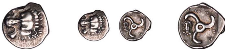
383 Perikles (380-360), Third Stater, facing lion's scalp, rev. triskeles, facing laureate and draped bust of Apollo in left field, 2.94g/11h (Müseler VIII, 44; SNG Keckman 495). The obverse struck from a worn die, otherwise good very fine, the control mark handsome £150-£180