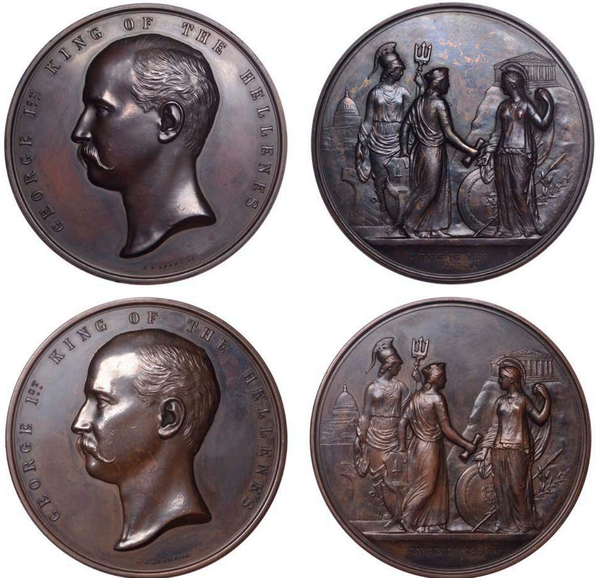
345 Visit of King George I of Greece to London, 1880, a presentation pair of bronze medals by G.G. Adams, bust left, revs. Londinia welcoming Hellas, Britannia behind, both 76mm, 226.65g, 225.87g (Karamitsos 675; Welch 16; W & E 1372.1; BHM 3077; E 1668). Extremely fine or better, some minor staining on the reverse of one medal, very rare; in maroon fitted gilt-blocked case of issue [this a scuffed at extremities] £800-£1,000