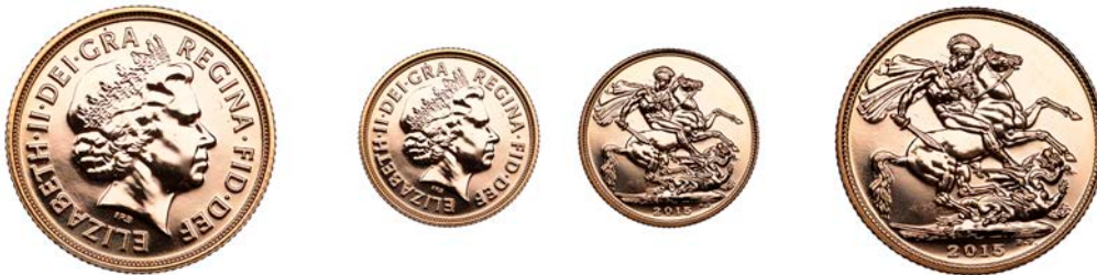
G 235 Sovereign, 2015, fourth bust (S SC7). Practically as struck