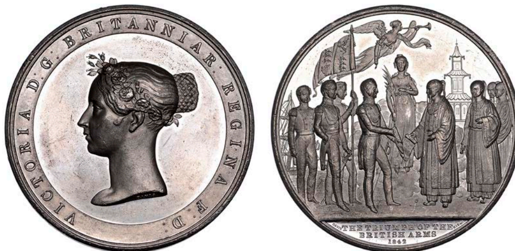
333 Treaty of Nanking, 1842 , a white metal medal by J. Davis, bust left, rev. British and Chinese delegations greeting each other, Fame flying above, pagoda in background, 64mm (Eimer 1367; BHM 2061). A pleasing example with much bloom, extremely fine and extremely rare £3,000-£4,000

Provenance: A Collection of Medals relating to C. Cornwallis, 1st Marquis.