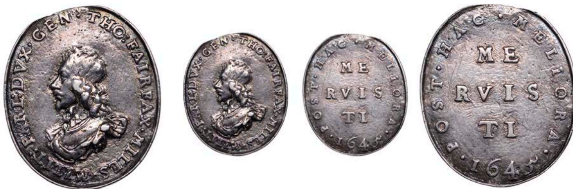
290 Sir Thomas Fairfax, 1645 , a cast oval silver badge, unsigned [by T. Simon], armoured bust left, THO FAIRFAX MILES MILIT PARL DVX GEN, rev. POST HAC MELIORA, MERVISTI in three lines across field, 39 x 29mm, 6.06g (Platt II, p.97, type A; MI I, 317/150; E 146a). Loop removed from 12 o'clock and with scratching to the reverse, otherwise good fine, toned and rare £400-£500