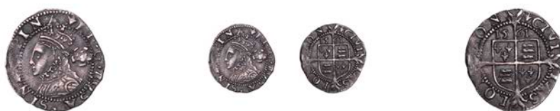
142 Third issue, Threefarthings, 1561, mm. pheon, bust 3I, 0.34g/6h (BCW xxx; N 2002; S 2571). A few trifling marks, otherwise good very fine, well struck up and toned £200-£260

Provenance: C. Comber Collection, Part III, St James Auction 62, 14 June 2022, lot 421 [Bt Baldwin 1983]