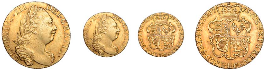
177 Guinea, 1775, fourth bust right, rev. crowned shield of arms (EGC 691; MCE 380; S 3728). Very fine