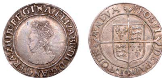
140 First issue, Shilling, mm. lis, bust 2B, wire line inner circles, reads ELIZABETH and REGINA, rev. POSVI/DEVM ; AD/IVTORE/M . MEVM, 5.94g/5h (BCW LS-5c:LS-g3; N 1985; S 2548). Minute attempted piercing at 12 o'clock, otherwise good fine, reverse better, full round flan, old cabinet toned £400-£600

Provenance: SNC September 1898 (48067); A.L. Fuller Collection (1870-1941)