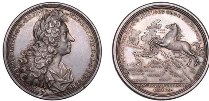
308 George I, Accession, 1714 , a silver medal, unsigned [by G. Vestner], laureate and draped bust right, star below, rev. Hanoverian horse leaps from Germany to England, chronogrammatic date, 44mm, 30.09g (MI II, 422/5; E 465). Some minor marks on edge with light rubbing on high points, otherwise extremely fine and prettily toned, rare £900-£1,200