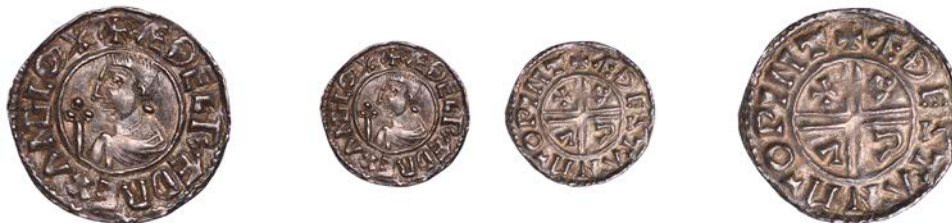
49 Penny, CRVX type [BM IIIa; BEH C], Winchester , Æthelstan, ÆDESTAN M-O PINT, 1.63g/6h (Winchester Mint 324; BEH 4084; N 770; S 1148). Good very fine, toned £400-£500