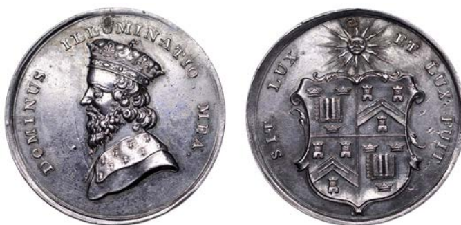
317 The Alfred Lodge, Oxford, 1772 , a unsigned silver member's badge, crowned bust of the king left, university motto around, rev. a sun in splendour above an armorial, SIT LUX ET LUX FUIT, 40mm, 26.96g (Worcester 9; BHM –; E –). Without the original suspension loop, otherwise good very fine, sometime polished and now retoned; a very rare medal £1,200-£1,500

One of the rarest of Masonic medals, struck in November 1772, in an edition of 40, for master masons of the lodge, for a fee of half a guinea (10s 6d ) The Alfred Lodge, for members of Oxford University, was in existence from 1769 - 1790.