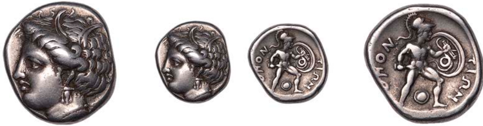
380 Lokri Opuntii , Stater, struck c. 370-60, head of Persephone left, wearing crown of barley, pendant earring and pearled necklace, rev. \text{OΠOΝΤΙΩΝ} : Ajax in heroic attitude, holding sword and shield decorated with serpent, advancing right, small shield between legs, 11.70g/1h (Humphris/Delbridge Gp 4, 49; BCD Lokris 15). Very fine, light grey tone £400-£500