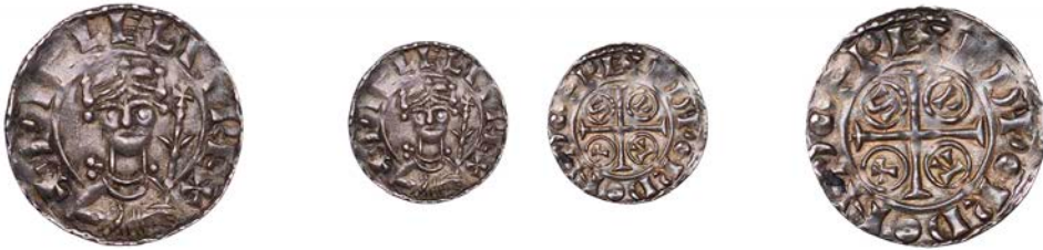
66 Penny, PAXS type [BMC VIII], Dover , Edword, +EDPORD ON DOFRE, 1.30g/12h (Allen 2022, p.174; EMC –; N 848; S 1257). Good very fine, grey toned, the moneyer very rare £500-£700

Provenance: HJ. Berk Auction 201, 13 July 2017, lot 514 (described as Gloucester, moneyer not stated); T. Wright Collection