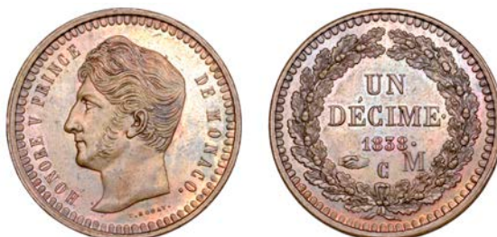
271 Honore V , Essai Décime, 1838 MC , Monaco, edge plain, 14.24g/6h (Gad. MC111; KM Pn5). A pleasing example, good extremely fine £150-£200