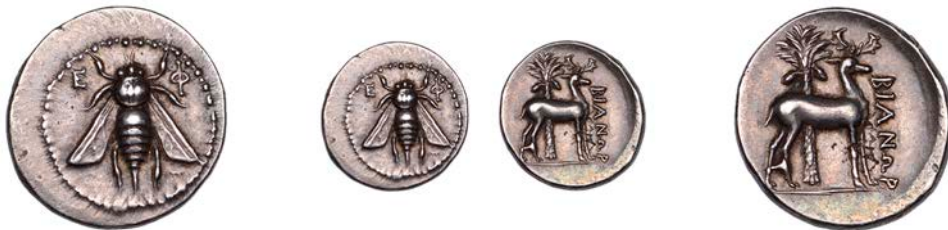
381 Ephesos , Drachm, Attic standard, struck c. 202-150 by the magistrate Bianor, bee with straight wings, flanked by ethnic, rev. stag standing before palm tree, \text{BIANΩP} down to right, 4.13g/12h (Kinns, Attic 2.9, same dies; SNG Copenhagen 287). Good very fine, minor metal flaw on reverse, rich golden-grey tone £300-£400