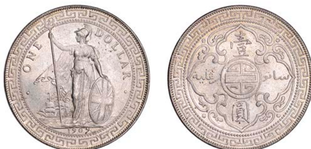
256 Trade Dollar, 1909B, 27.00g (Prid. 19; KM T5). Good extremely fine, grey toned over residual lustre