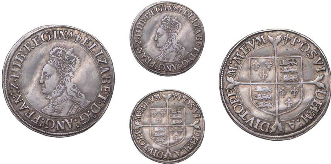
139 First issue, Shilling, mm. lis, bust 1B, wire line inner circles, reads ELIZABETH and REGINA, rev. POSVI/DEVM : A/IVTORE/M : MEVM, 5.99g/8h (BCW LS-2A/LS-a2; N 1985; S 2548). Old crease marks, otherwise about very fine, centrally struck on an almost round flan with attractive grey tone, rare £1,000-£1,500