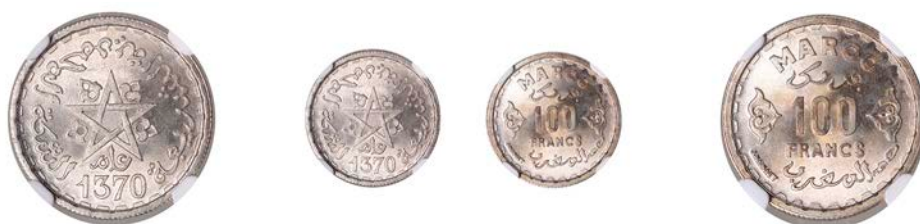
272 Mohammed V , 100 Francs, AH 1370 (1951), Paris (Lec. 285; KM Y.A54). Lustrous, practically as struck, extremely rare [Graded by NGC as MS 66] £200-£300