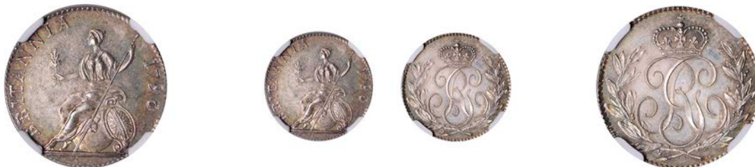
181 Pattern Sixpence, 1790, by J.P. Droz, in silver, crowned cypher within wreath, rev. Britannia seated left, edge grained, 12h (ESC 2219; Selig -; S -). Prettily toned, good extremely fine and rare [Graded by NGC as PF 64] £500-£600