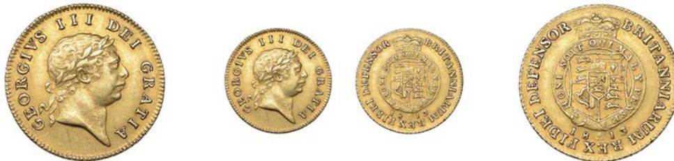
G 180 Half-Guinea, 1813, seventh bust (EGC 859; S 3737). Minute scratch below bust, otherwise about extremely fine £500-£700