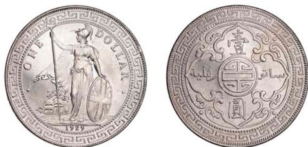
258 Trade Dollar, 1929B, 27.00g (Prid. 26; KM T5). Good extremely fine, mint bloom