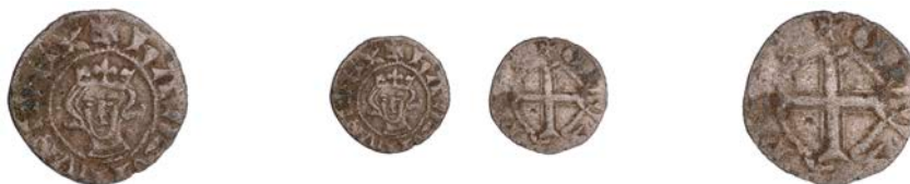
274 Haakon V , (as king, 1299-1319), Black Half-Sterling, no mint name, crowned bust facing, +HAQVINVS REX, rev. CR VX XP I: (?). cross potent, 0.75g/6h (Ahlstrom 37-3 for type). Obverse good fine, reverse about fine, very rare £1,200-£1,500