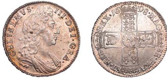
165 Halfcrown, 1698, edge DECIMO (ESC 1034; S 3494). Good extremely fine, lightly toned over mint bloom