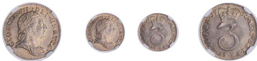
182 Maundy Threepence, 1762 (ESC 2254; S 3753). Attractive cabinet tone with a golden hue, mint state [Graded by NGC as MS 65] £100-£120