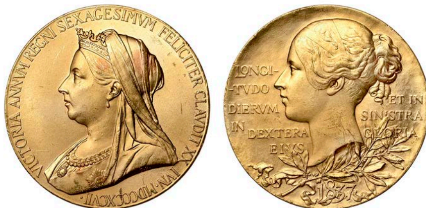
349 Victoria, Diamond Jubilee, 1897 , a large gold medal by G.W. de Saulles, veiled bust left, rev. young head left, 55mm, 92.34g (W & E 3000A.5; BHM 3506; E 1817a). Nicks and scuffs, particularly around the edge, otherwise good very fine £12,000-£15,000