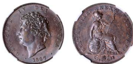
200 Halfpenny, 1827 (BMC 1438; S 3824). Extremely fine, glossy patina [slabbed NGC MS 64 BN]

Provenance: Heritage Auction 3024 (Chicago), 18 April 2013, lot 27626; Heritage Auction 3057 (Long Beach), 7-8 September 2017, lot 33250