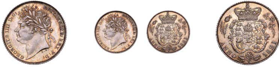
195 Sixpence, 1821 (ESC 2421; S 3813). Attractive cabinet tone, good extremely fine [Graded by NGC as MS63]