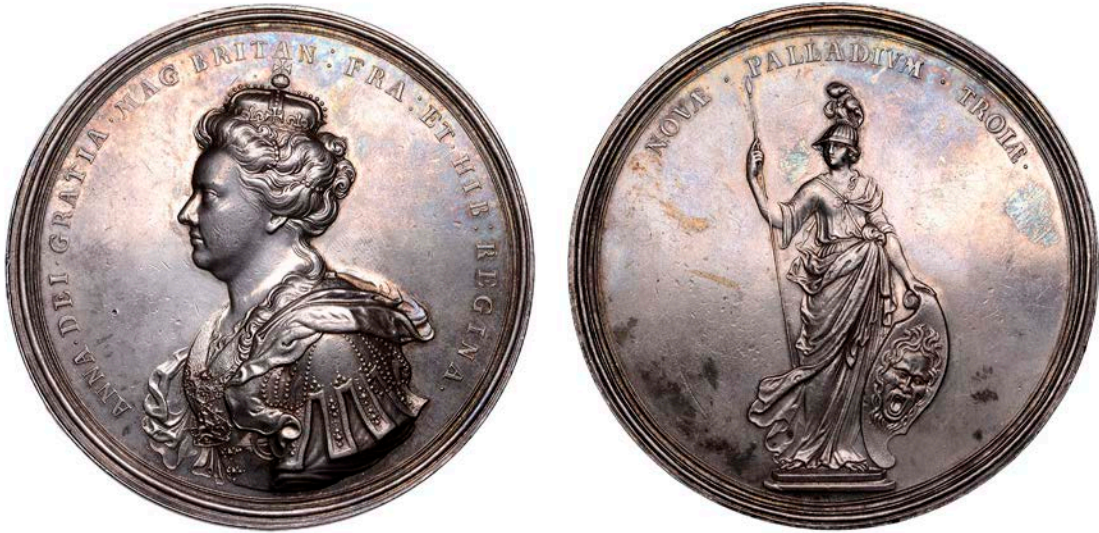
307 Union of England and Scotland, 1707 , a silver medal by J. Croker, draped and crowned bust of Anne left, rev. NOVAE PALLADIUM TROIAE, statue of Anne as Pallas, standing with spear and shield, 70mm, 106.76g (MI II, 298/115; E 423). Sometime cleaned, good very fine £300-£400