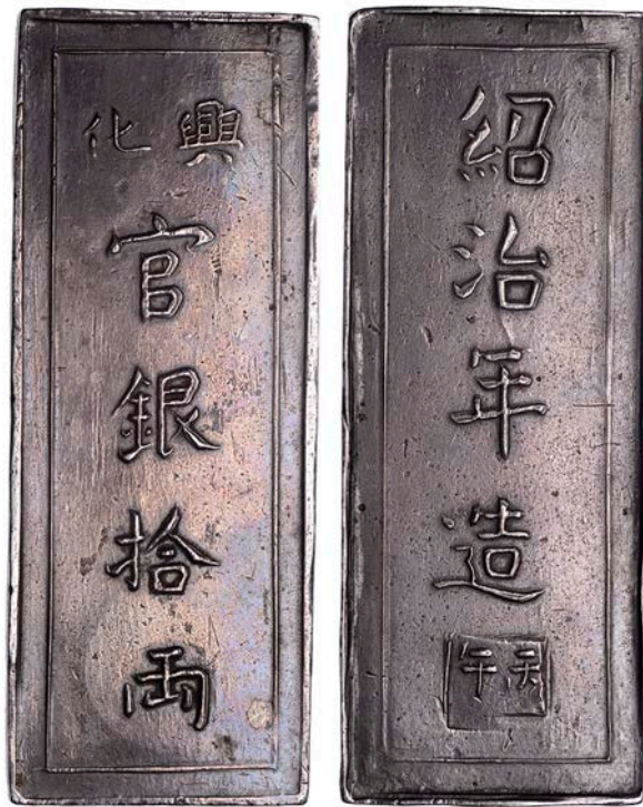
286 Dai Nam, Thiệu Tri (1841-47), silver 10 Lang, c. 1847, Hung Yen province, 122 x 46mm, 385.16g. Very fine, extremely rare