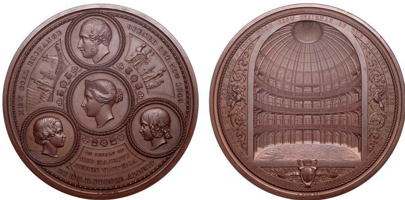
336 Opening of the New Coal Exchange, 1849 , a copper medal by B. Wyon for the Corporation of the City of London, medallion portraits of the Queen, Prince Albert, the Prince of Wales and the Princess Royal, rev. interior of the Coal Exchange, 89mm, flan thickness 10mm (W & E 581A.2; Taylor 161c; BHM 2357; E 1435). Good extremely fine, attractive patina £500-£600

Provenance: From a Collection of Great Exhibition and Related Medals, the Property of a Gentleman