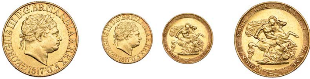
G 185 Sovereign, 1817 (Hill 1; S 3785). Cleaned, otherwise good very fine