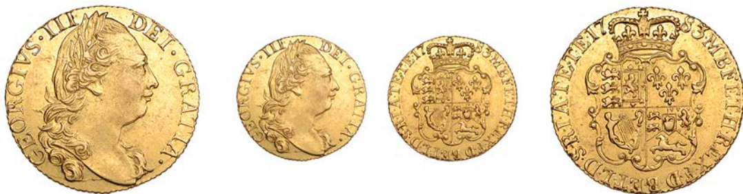
178 Guinea, 1783, fourth bust (EGC 704; MCE 387; S 3728). Better than very fine, scarce