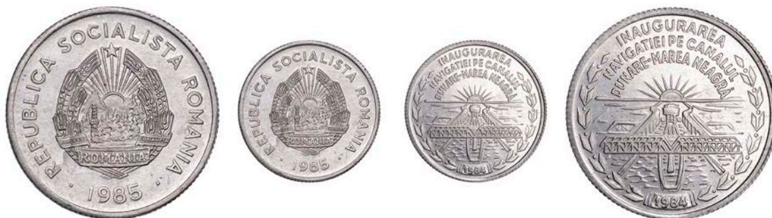
277 Socialist Republic, Pattern 100 Lei, 1985, in white metal, Inauguration of the Danube-Black Sea Canal, 6.06g/6h. Practically as struck, a superb example and of the absolute highest rarity £2,400-£3,000