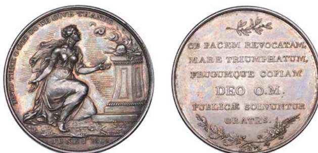
329 Treaty of Amiens , 1802, a silver medal by H & L., goddess kneeling right, gesturing towards lighted altar surmounted by arms, rev. legend in 6 lines, tied oak branch and cornucopia below, 39mm, 29.67g 9BEH 542; E -). Good very fine, toned, extremely rare £150-£180

Provenance: A Collection of Medals relating to C. Cornwallis, 1st Marquis [bt Prestons November 1970]