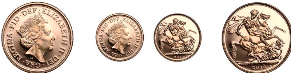
G 236 Sovereign, 2016 (S SC9). As struck; in original box of issue