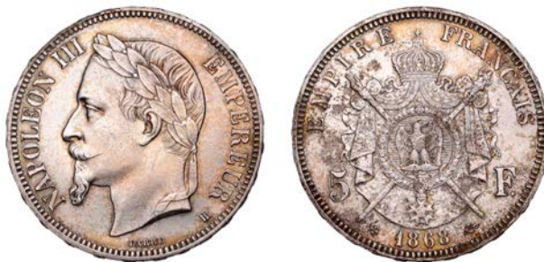
264 Napoleon III, 5 Francs, 1868 BB , Strasbourg (Gad. 739; KM 799.2). Toned, extremely fine