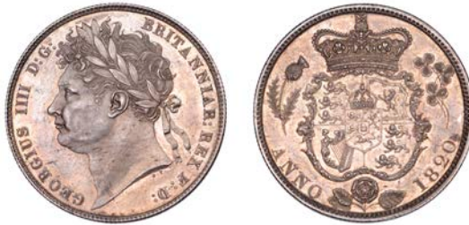
191 Halfcrown, 1820 (ESC 2357; S 3807). Light cabinet tone over prooflike fields, good extremely fine