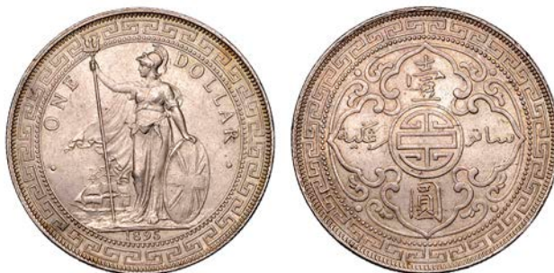
254 Trade Dollar, 1895, 26.91g (Prid. 2; KM T5). Better than extremely fine, grey toned