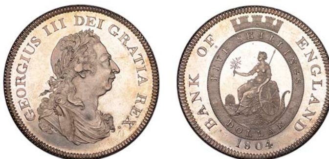
184 Dollar, 1804, types D/2a, leaf to end of E in DEI, retrograde K to left of shield (ESC 1945; S 3768). Struck on a 1793 Mexican Dollar; the fields a trifle hairlined, otherwise bright and proof-like, good extremely fine £400-£500 Provenance: Bt J. Duggan 1970