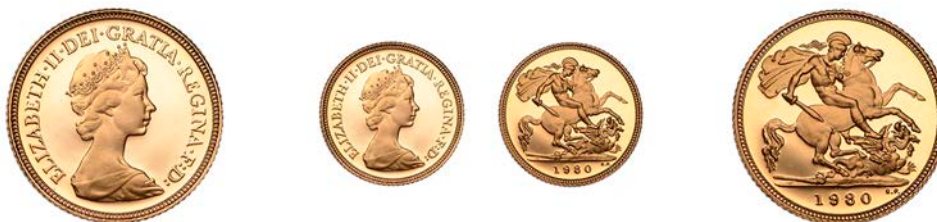
G 240 Proof Half-Sovereign, 1980, edge grained, 3.99g/12h (Hill 543D; S SB1). As struck; in red case of issue