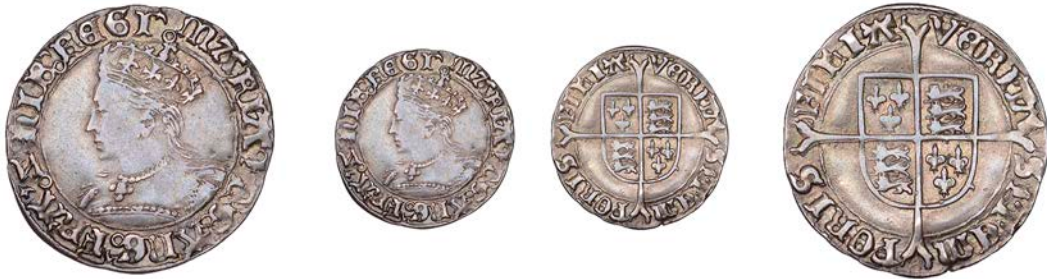
137 Groat, mm. pomegranate, small spur from shield in fourth quarter, 2.00g/5h (N 1960; S 2492). Very fine, attractive glossy patina