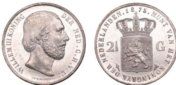
273 Willem III , Two-and-a-Half Gulden, 1873, Utrecht (Sch. 599). Bagmarks, otherwise a pleasing example with frosted devices, extremely fine £100-£120