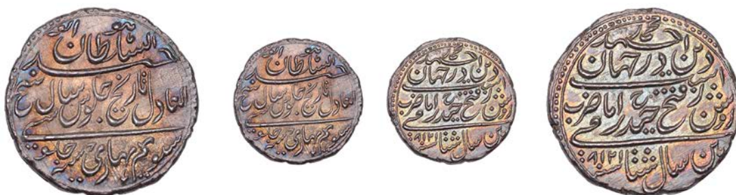
266 MYSORE, Tipu Sultan, Rupee, AH 1218 (1789/90), Patan (Seringpatan), 11.32g/12h (KM 126). Extremely fine, beautiful iridescent tone