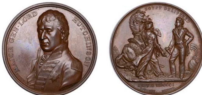
325 Delivery of Egypt, 1801 (1820) , a bronze medal by T. Webb and A. Dupre from Mudie's National series, Lord Hutchinson three-quarters left, rev. Hutchinson standing left receiving peace treaty from the Bey of Egypt, pyramid and classical ship behind, 41.5mm (BHM 509; Eimer 934; Mudie 9). Practically as struck with an attractive chocolate brown patina £100-£120

Provenance: A Collection of Medals relating to C. Cornwallis, 1st Marquis.