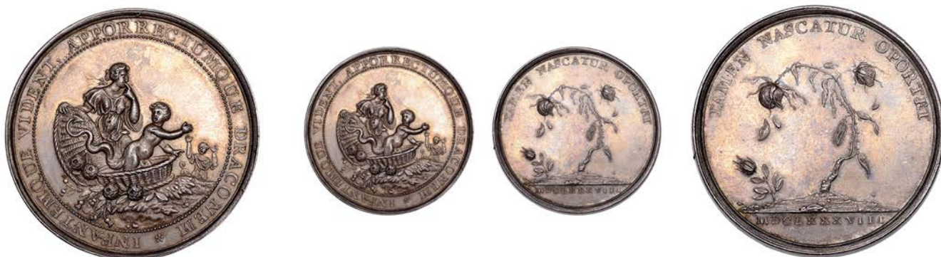
298 Birth of Prince James, 1688 , a silver medal, unsigned, INFANTEMQUE VIDENT APPOR RECTUMQUE DRACONEM, Aglauros opening the basket discovers Erichthonius with his dragon tail, roses and thistle around, two women run in fright at right, rev. TAMEN NASCATUR OPORTET, withered rosebush with two flowers, young sucker growing at left, 50mm, 44.20g (Woolf 2:1; MI I, 631/53; E -). Extremely fine, a few trifling hairlines, rich cabinet tone over reflective fields £1,500-£2,000