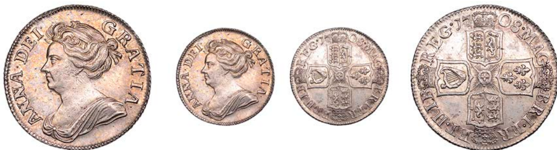
168 Shilling, 1708, third bust, plain angles (ESC 1399; S 3610). Light cabinet toning with much mint bloom, extremely fine