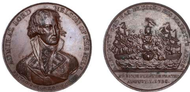
323 Battle of the Nile, 1798 , a bronze medal by Thomas Wyon Sr., bust of Nelson three-quarters left, rev. view of naval engagement, 38mm (BHM 452; Eimer 893). Some verdigris on reverse, otherwise extremely fine, scarce £90-£120