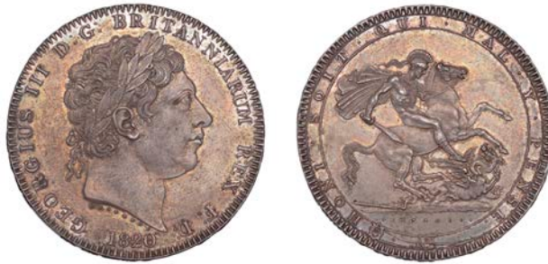
186 Crown, 1820, edge LX (ESC 2016; S 3787). Satin toning over subdued reflective fields, good extremely fine or better