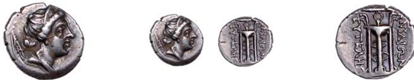
382 Knidos , Tetrobol, 250-210, bust of Artemis right, wearing Stephane, bow and quiver over shoulder, rev. tripod, \text{ΚΝΙΔΙΩΝ ΘΕΥΤΕΛΗΣ} , 2.36g/12h (SNG Cop 287). Better than very fine, attractively toned £120-£150