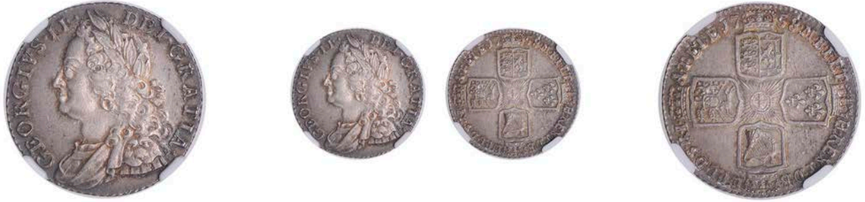
175 Shilling, 1758 (ESC 1734; S 3704). Attractive cabinet tone, good extremely fine [Graded by NGC as MS 63]