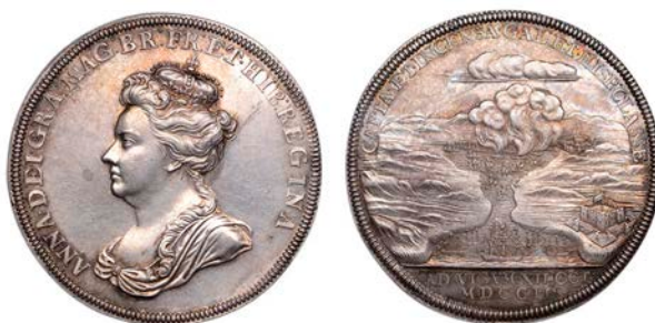
304 Expedition to Vigo Bay, 1702 , a silver medal, unsigned [by J. Croker], crowned and draped bust of Anne left, rev. CAPTA ET INCENSACAL ET HISP CLASSE, ships burning in blockaded harbour, English fleet beyond, 37mm, 18.05g (MI II, 236/18; E 395a). Obverse once wiped, otherwise good very fine, reverse toned and perhaps a little better £150-£200