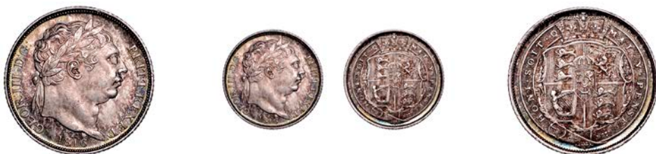
189 Sixpence, 1816 (ESC 2191; S 3791). Beautifully toned over lustrous fields, good extremely fine