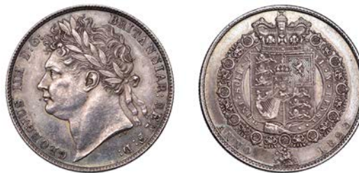
193 Halfcrown, 1823 (ESC 2365; S 3808). Some light surface marks, otherwise extremely fine or better, toned