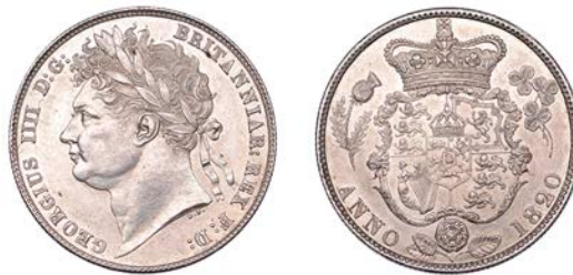
192 Halfcrown, 1820, lightly garnished (ESC 2357; S 3807). Extremely fine, lustrous