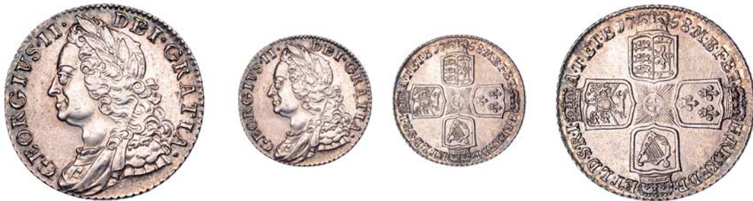
176 Shilling, 1758 (ESC 1734; S 3704). Cleaned but since re-toned, otherwise extremely fine