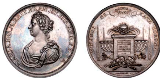
303 Death of Mary II, 1694 , a silver medal by J. van Dishoeke, draped bust left, rev. mellori ornata corona, sarcophagus, cyprus trees behind, altar in foreground surmounted by laureate skull, 49mm, 54.46g (MI 121/365). Fields rubbed, about extremely fine £200-£260