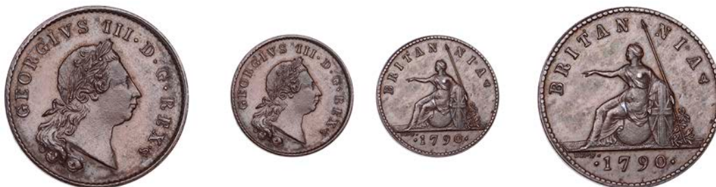
183 Restrike Pattern Farthing in Copper, 1790, GEORGIVS III D G REX, laureate head right, rev. BRITANNIA, Britannia seated left on glove, arm outstretched, edge plain, 6.66g/6h (BMC 1035 [R37]). About as struck, attractive brown patina £1,600-£1,800