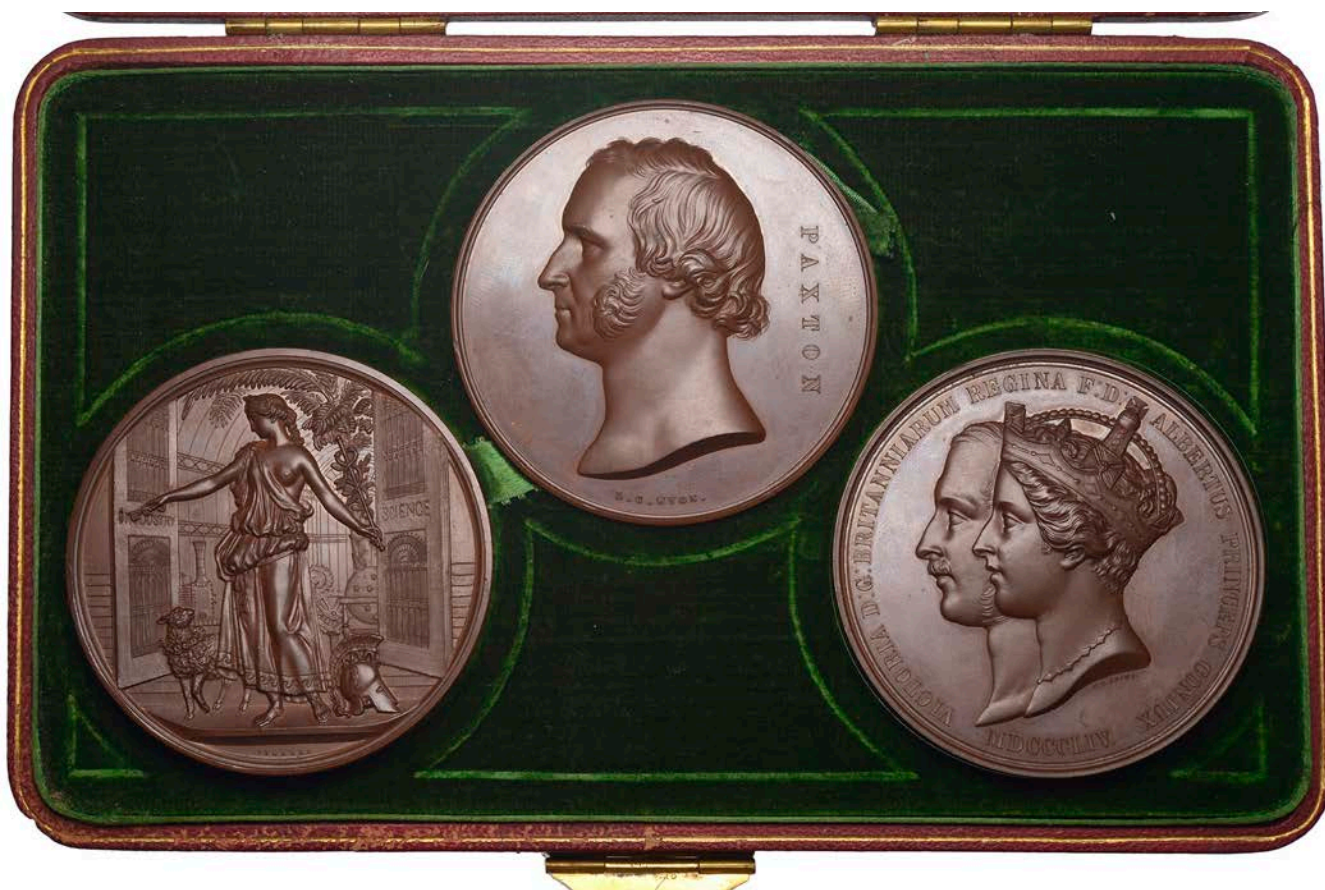
341 Crystal Palace Opened, Sydenham, 1854, bronze medals (3), all 64mm, by J.G. Adams, jugate busts left, rev. Britannia standing between industry and commerce (BHM 2545; E 1485), by Pinches, standing muse opening doors to the Crystal Palace, flanked by lamb and Corinthian helmet, rev. view of the exhibition buildings (BHM 2549; E 1487b), by L.C. Wyon for Pinches, bust of James Paxton left, rev. as last, (BHM 2552; E 1487) [3]. All as struck; in original ornate gilt-blocked case by the Crystal Palace Company, very rare thus £600-£800

Provenance: From a Collection of Great Exhibition and Related Medals, the Property of a Gentleman