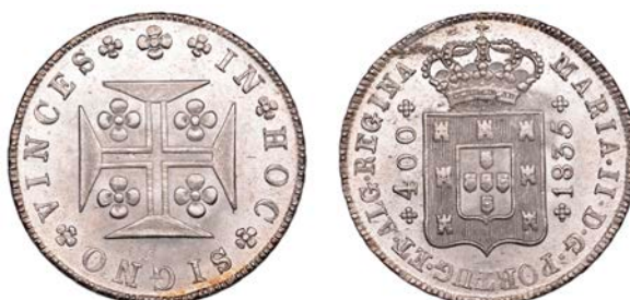
276 Maria II , 400 Reis, 1835, Lisbon (Gomes 16.03; KM 403.2). Lustrous, good extremely fine £120-£150