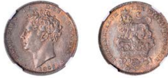
196 Sixpence, 1826, type 3 (ESC 2433; S 3815). Attractive cabinet toning, good extremely fine [Graded by NGC as MS 64]