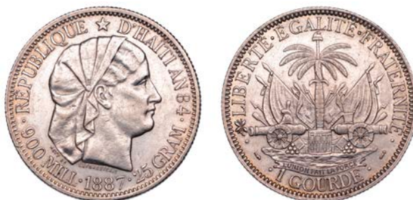
265 First Republic, Gourde, 1887, Paris (KM 46). Lightly cleaned, otherwise extremely fine