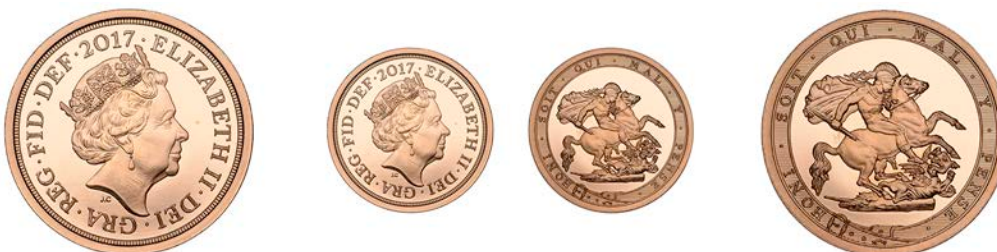
G 237 Proof Sovereign, 2017, 200th Anniversary of the Sovereign, Strike on the Day, edge plain, 8.01g/12h (S SC11A). Brilliant as struck; in original box of issue, rare