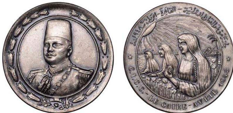
361 International Cotton Congress, 1948 , a plated bronze medal, unsigned [by T. Bichai], bust of Farouk half-left in military attire, rev. three females picking cotton under a blazing sun, 50mm, 74.52g (Van Daele –; cf. SJA 58, 420). About extremely fine, rare; in original brown fitted card box of issue by Tewfik Bichai, Fournisseur de S.M. le Roi £150-£200