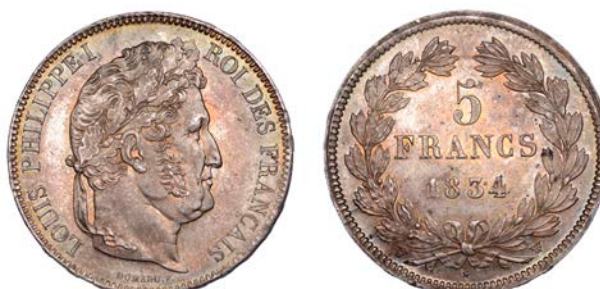
261 Louis Philippe I , 5 Francs, 1834A, Paris (Gad. 678; KM 749.1). Attractive rainbow toning with subdued lustre, extremely fine