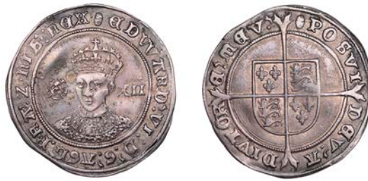
136 Third Period, Fine issue, Shilling, mm. tun, 6.05g/6h (N 1937; S 2482). Some small deposits on obverse, otherwise good very fine