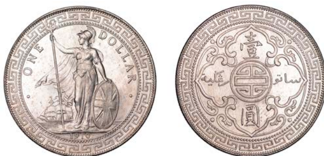
257 Trade Dollar, 1910B, 26.93g (Prid. 20; KM T5). Practically as struck, much original mint bloom