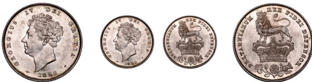
194 Shilling, 1826 (ESC 2409; S 3812). Practically mint state, considerable bloom [Graded by NGC as MS 64]