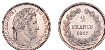
262 Louis Philippe I , 2 Francs, 1847A, Paris (Gad. 520; KM 743.1). Extremely fine or better