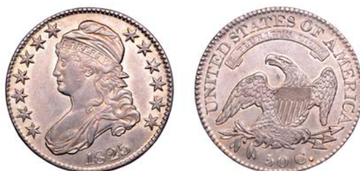
285 Half-Dollar, 1825, Philadelphia (KM 37). Possibly once lightly cleaned but since re-toned, about extremely fine £200-£300