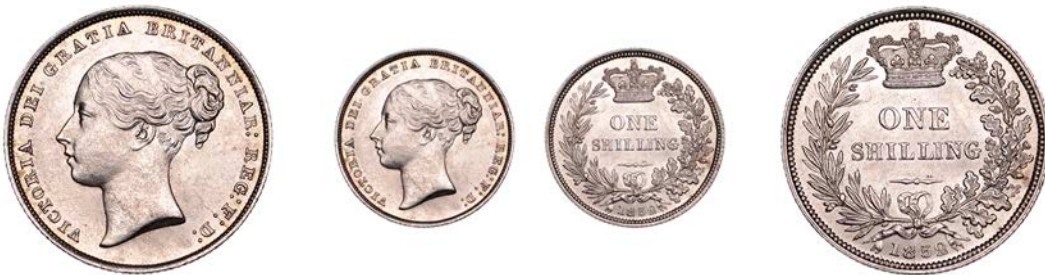
213 Shilling, 1852 (ESC 3001; S 3904). Lustrous, good extremely fine