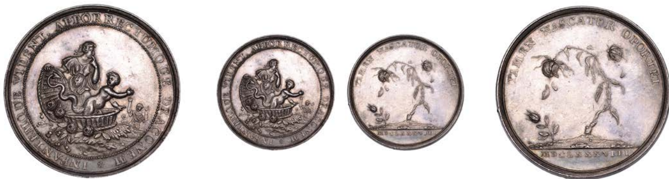
299 Birth of Prince James, 1688 , a silver medal, unsigned, INFANTEMQUE VIDENT APPOR RECTUMQUE DRACONEM, Aglauros opening the basket discovers Erichthonius with his dragon tail, roses and thistle around, two women run in fright at right, rev. TAMEN NASCATUR OPORTET, withered rosebush with two flowers, young sucker growing at left, 50mm, 46.90g (Woolf 2:1; MI I, 631/53; E -). A few light marks and scratches, otherwise nearly extremely fine £1,200-£1,500