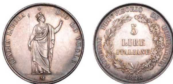
268 LOMBARDY, 5 Lire, 1848 M , Milan (MIR 527; KM C.22). Cabinet tone, extremely fine