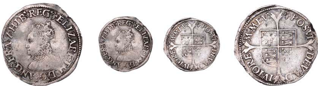
141 First issue, Groat, mm. lis [1558-60], bust 1F, wire line inner circles, reads ELIZABETH D G AN G FRA Z HIB REG, 2.01g/3h (BCW LS-1E; N 1986; S 2550). Good fine, rare £200-£260

Provenance: SNC September 1898 (48067); A.L. Fuller Collection (1870-1941)