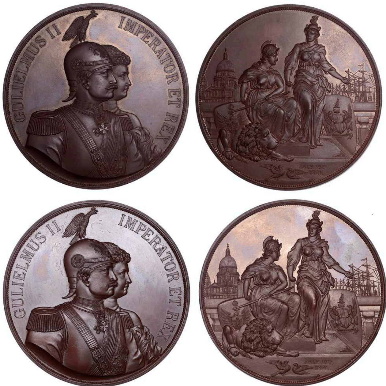
348 Visit of Kaiser Wilhelm II to the City of London, 1891 , a presentation pair of bronze medals by Elkington & Co for the Corporation of the City of London, conjoined busts of Wilhelm and Princess Augusta right, revs. Londinia indicating shipping on the Thames to a figure of Prussia, St Paul's behind, both 80mm, 336.16g, 334.58g (W & E 1668.1; BHM 3412; E 1768) [2]. Virtually as struck, very rare; in leather gilt-blocked fitted case of issue £800-£1,000