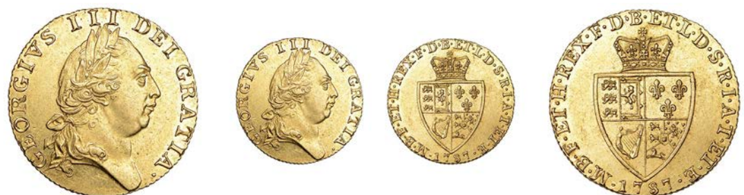
179 Guinea, 1787, fifth bust (EGC 711; S 3729). Hairlines, otherwise lustrous, nearly extremely fine