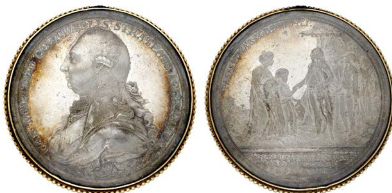
321 Defeat of Tipu Sultan, 1793 , a silver medal by C.H. Küchler, uniformed bust of Marquis Cornwallis left, rev. Cornwallis receives the sons of Sultan Tipoo as hostages, 48mm (Pudd. 792.1.2; BHM 363; E 845). Within a glazed lunette joined by a gilt band, with loop and ring for suspension, extremely fine and toned £600-£800

Provenance: A Collection of Medals relating to C. Cornwallis, 1st Marquis.