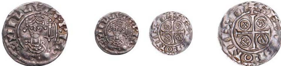
67 Penny, PAXS type [BMC VIII], Exeter , Sæmær, SEMIER ON IEXEC, 1.35g/3h (Brettell 269, same rev. die; Allen 2022, p.174; N 850; S 1257). Very fine, toned £400-£500

Provenance: CNG Mailbid Sale 57, 4 April 2001, lot 1834; T. Wright Collection