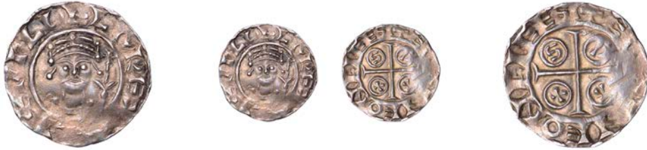
65 Penny, PAXS type [BMC VIII], Chichester , Eadwine, EDPINE ON CIEESI, 1.34g/3h (Allen 2022, p.171; HHK 165; BMC 611; N 850; S 1257). Very fine, toned £400-£500

Provenance: HJ. Berk Auction 201, 13 July 2017, lot 514 (described as Gloucester, moneyer not stated); T. Wright Collection