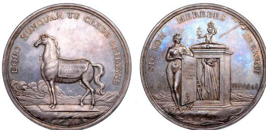
297 Birth of Prince James, 1688 , a silver medal, unsigned [by J. Smeltzing], SIC NON HEREDES DEERUNT, Truth standing, holding open cupboard door to reveal Jesuit supporting cushion upon which sits the infant prince, fleet on horizon in background, rev. EQUO NUNQUAM TU CREDE BRITANNE, Trojan horse left, Troy burning in background, 59mm, 79.40g (Woolf 3:3; MI I, 630/52; E 291). A few light marks, otherwise nearly extremely fine, old rich tone with light hairlines across bright fields £800-£1,200