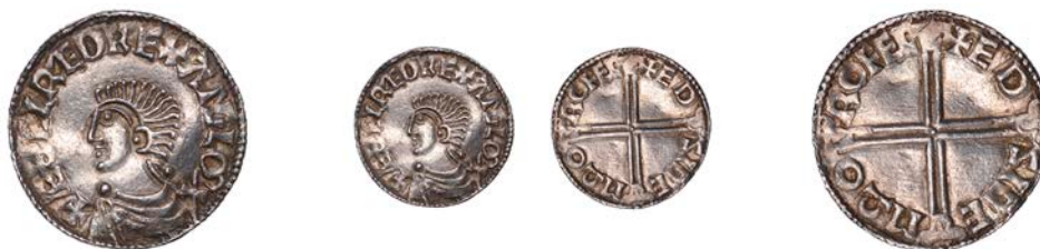
51 Penny, Long Cross type [BMC IVa; BEH D], Rochester , Eadsige, EDSIGE MDO ROFEC, 1.70g/7h (SCBI Mack 954, South Eastern Museums 938; BEH 3285; N 774; S 1151). Minimal trace of crease, good very fine, lightly toned £300-£400