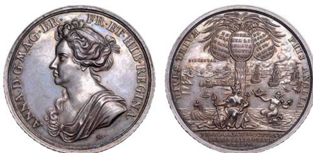
x 306 Anne, British Victories, 1704 , a silver medal by G. Hautsch, draped bust left, rev. Britannia seated against palm tree, ships engaging off the coast of Gibraltar in background, edge lettered, 40mm, 26.43g (MI II, 270/70; E 411). A pleasing example with attractive cabinet tone, good extremely fine, scarce £800-£1,200