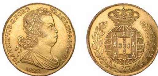
G 275 João VI , Peça or 6400 Reis, 1822, Lisbon (Gomes 18.05; KM 364). A pleasing example with some residual lustre on reverse, almost extremely fine £1,800-£2,200