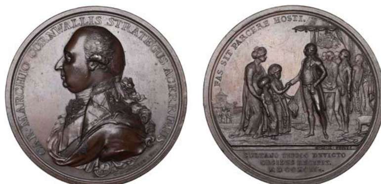
322 Defeat of Tipu Sultan, 1793 , a copper medal by C.H. Küchler, uniformed bust of Marquis Cornwallis left, rev. Cornwallis receives the sons of Sultan Tipoo as hostages, 48mm, 59.88g (Pudd. 792.1.2; Pollard 5; BHM 363; E 845). Minute scratch in reverse field, extremely fine, brown patina £150-£200

It is thought that the Tipu Sultan medals with the error date 1793 were struck first, with the dies then being corrected to 1792.