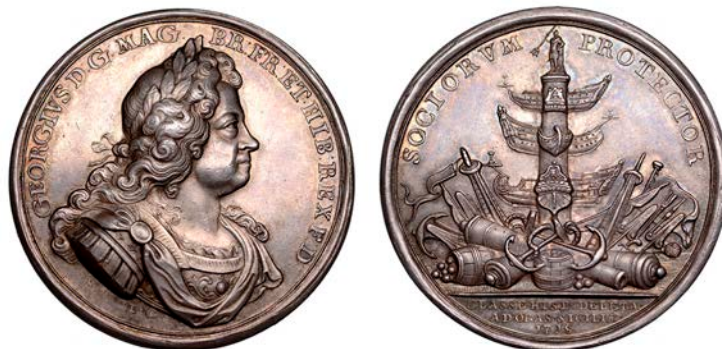
309 Spanish Fleet Destroyed off Cape Passaro, 1718 , a silver medal by J. Croker, laureate, draped and cuirassed bust of George I right, rev. King standing atop rostral column, naval trophies around, 45mm, 37.08g (MI II, 439/42; E 481). Almost extremely fine, fields lightly hairlined, grey toned £300-£400