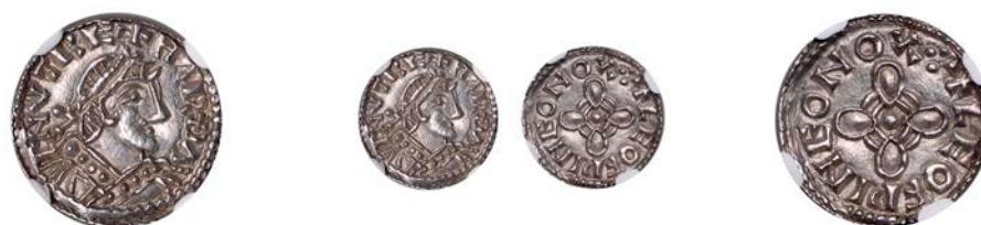
52 Penny, Jewel Cross type [BMC I; BEH A var. a], Oxford , Leofwine, HARDACNVT RE, bust right, rev. +LEOPINE ON OX:, 1.13g/10h (SCBI Stockholm –; BEH –; N 809; S 1167). Extremely fine, sharply struck and lightly toned over residual lustre; a handsome and very rare coin [Graded by NGC as MS 62] £4,000-£5,000