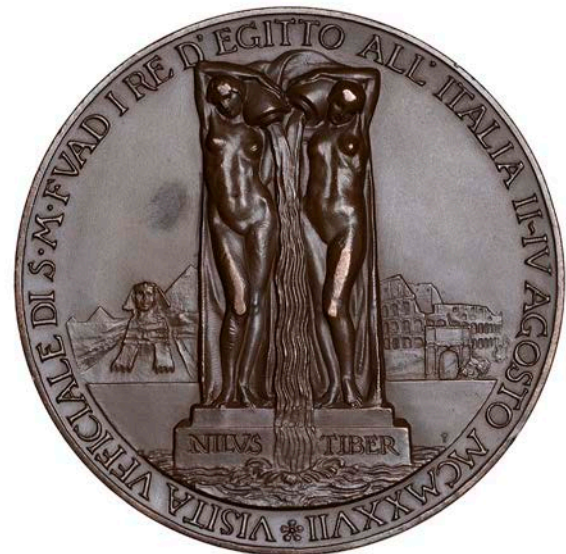
359 Fuad I, Official Visit to Rome, 1927 , a bronze medal by A. Mistruzzi, capped and uniformed bust right, rev. river goddesses of the Nile and Tiber standing together upturning urns of water, Egyptian and Italian landmarks in background, 72mm, 187.05g (Van Daele 158; Casolari V/98). About extremely fine, rare