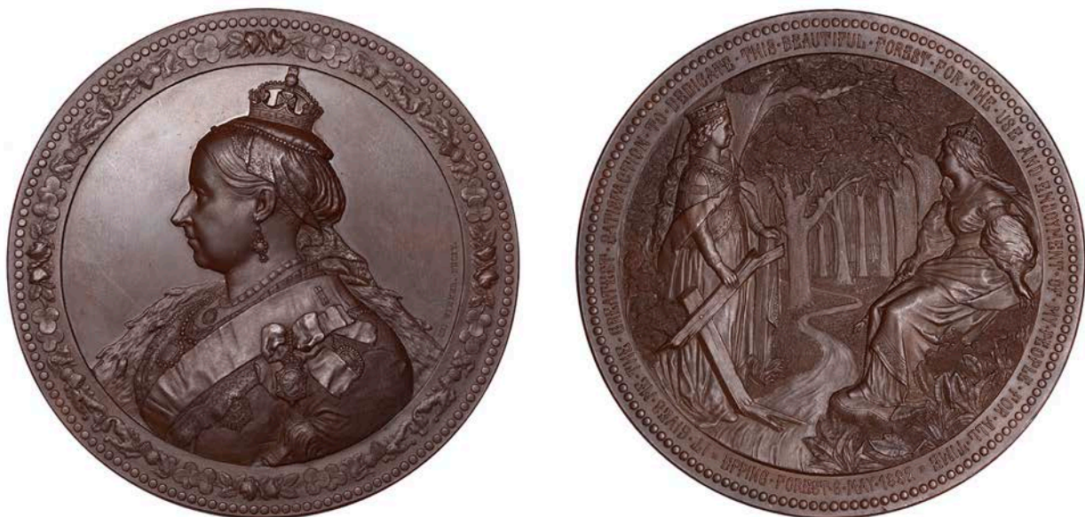
346 Dedication of Epping Forest, 1882 , a copper medal by C. Wiener for the Corporation of London, crowned and draped bust of Queen Victoria left, rev. view of the forest, Londinia standing at left, Victoria seated at right, 76mm, 193.30g (V & E 1400; BHM 3128; E 1689). Brilliant, virtually as struck; in black gilt-blocked fitted case of issue stamped Charles Wiener, Medallist, Brussels