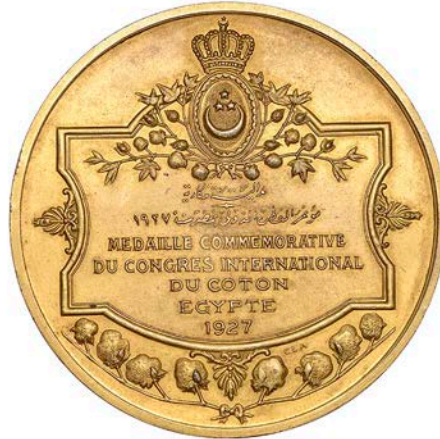
358 International Cotton Congress, 1927 , a gilt-bronze medal signed C.L.A., bust of Fuad right, rev. inscription within cartouche, crowned arms above, 57mm, 60.13g (Van Daele 154). Good very fine