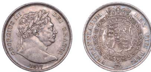
187 Halfcrown, 1817, large head (ESC 2090; S 3788). Attractively toned, residual lustre, good extremely fine