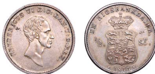
260 Frederik VI , Rigsbankdaler or Half-Speciedaler, 1834, straight neck, Copenhagen (Sieg 27.2; Hede 27B; KM 696.2). Light cabinet tone, about extremely fine £200-£300