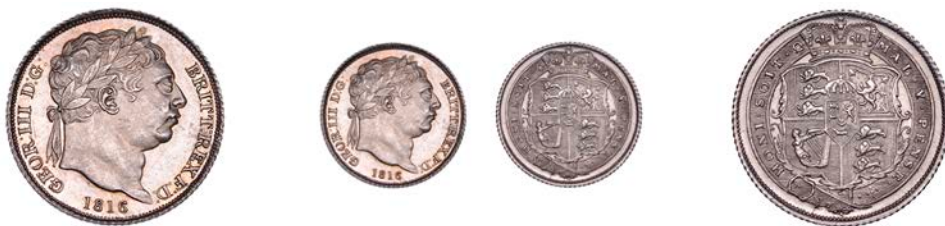
188 Sixpence, 1816 (ESC 2191; S 3791). Light cabinet tone with prooflike fields, good extremely fine

Provenance: Morton & Eden Auction 93, 27 June 2018, lot 301