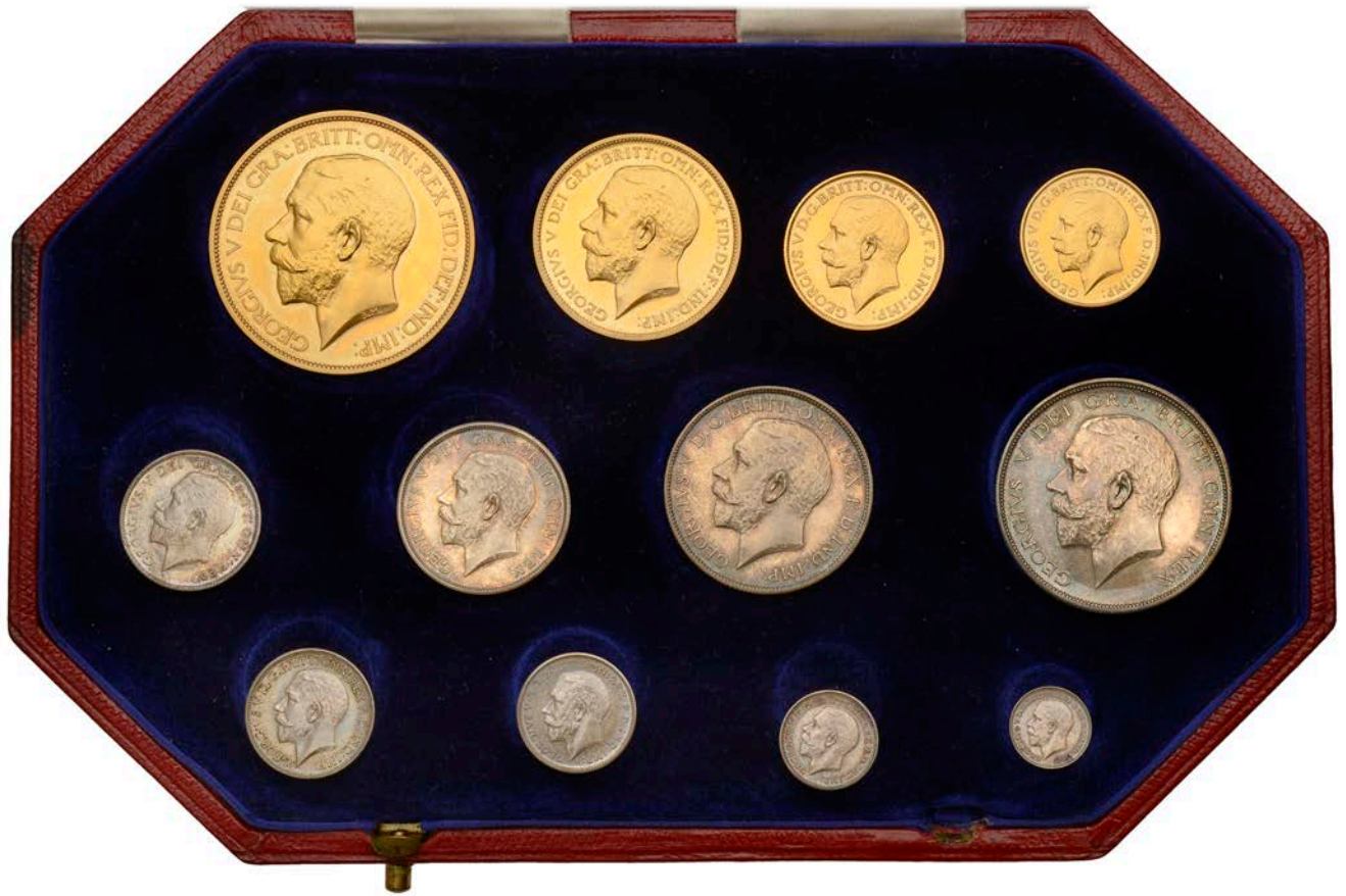
223 Proof set, 1911, comprising Five and Two Pounds, Sovereign and Half-Sovereign, Halfcrown to Maundy Penny [12]. Minor surface marks and brushed, otherwise good extremely fine, silver attractively toned; with official case of issue [Graded by NGC as PF 61, 62, 61, 61, 64, 63, 64, 64, 64, 63, 63, 64] £12,000-£15,000