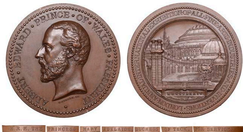
Princess Mary of Adelaide's Personal Presentation Medal

343 International Exhibition of all Fine Arts Industries and Inventions, 1874 , a bronze medal by G.T. Morgan, bust of Prince of Wales left, rev. Albert Hall, named (H.R.H. THE PRINCESS MARY ADELAIDE, DUCHESS OF TECK. FOR SERVICES), 52mm (BHM 2992; E 1633). Small scuff to front of Prince's chin, otherwise extremely fine £120-£150