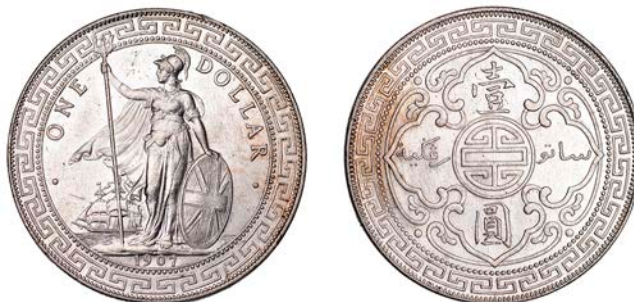
255 Trade Dollar, 1907B, 26.86g (Prid. 17; KM T5). Lightly bagmarked, otherwise extremely fine

Provenance: Bt Spink SNC, January 1980, 587