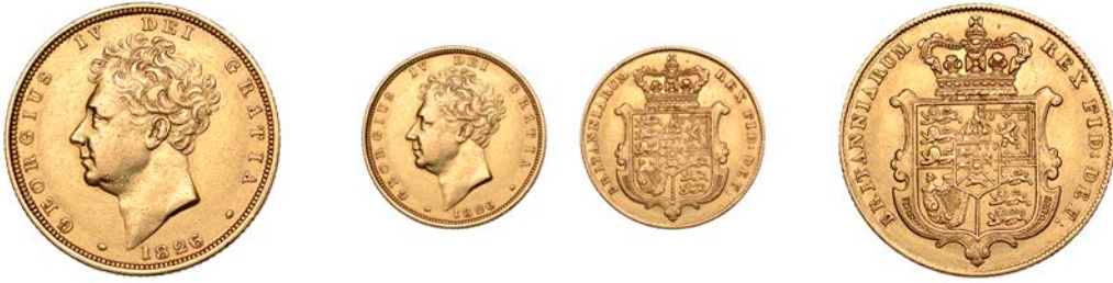
G 190 Sovereign, 1826 (Hill 11; S 3801). Cleaned, otherwise better than very fine