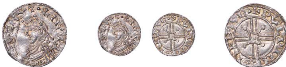
53 Penny, Arm and Sceptre type [BMC II; BEH B], Leicester , Wulfwine, WULPINE ON LERE, 1.11g/12h (SCBI Stockholm, 1634; BEH 81; N 811; S 1168). About extremely fine, light golden tone, very rare thus £2,000-£2,600