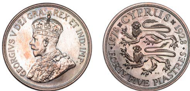
259 George V , Proof Forty Five Piastres, 1928 (Prid. 1A; Dav. 242; KM 19). Brilliant, about as struck, lightly toned over attractive fields, very rare thus £400-£500