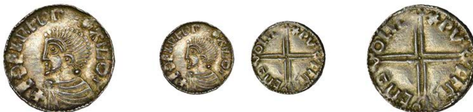
50 Penny, Long Cross type [BMC IVa; BEH D], Lincoln , Wulfric, +WULFRIC MDO LNC, 1.73g/12h (Mossop pl. xv, 28, same dies; BEH 2011; N 774; S 1151). A little weakness on the reverse, otherwise good very fine, attractively toned £400-£500