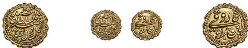
267 MYSORE, Tipu Sultan, Pagoda, AH 1220 (1792), Patan (Seringpatan), 3.43g/12h (KM 126). Good very fine