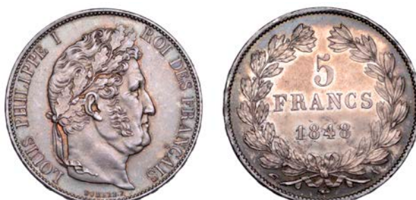
263 Louis Philippe I , 5 Francs, 1848A, Paris (Gad. 678; KM 749.1). Lustrous, good extremely fine