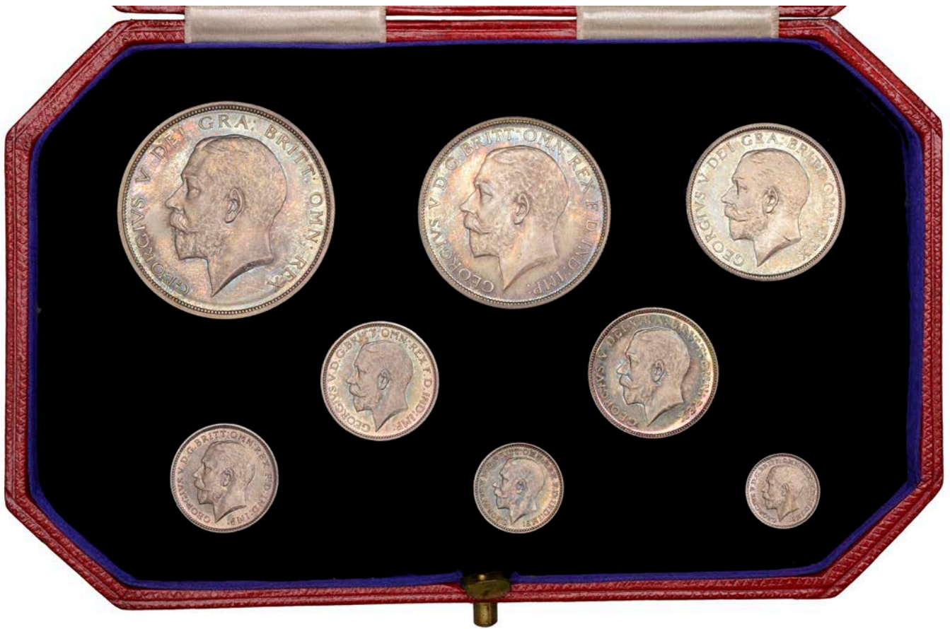
224 Proof Set, 1911, comprising Halfcrown to Maundy Penny (S PS13) [8]. Prettily toned, about as struck; in original red leather case of issue £300-£400