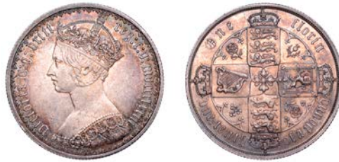
211 Florin, 1873, die 234 (ESC 2879; S 3893). Highly attractive cabinet tone with bright reverse fields, good very fine