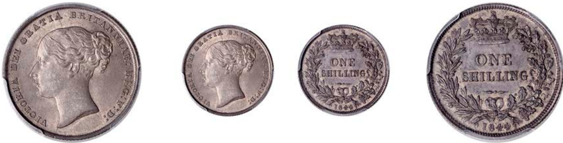
212 Shilling, 1844 (ESC 2990; S 3904). Grey tone, good extremely fine [Graded by PCGS as MS 64]