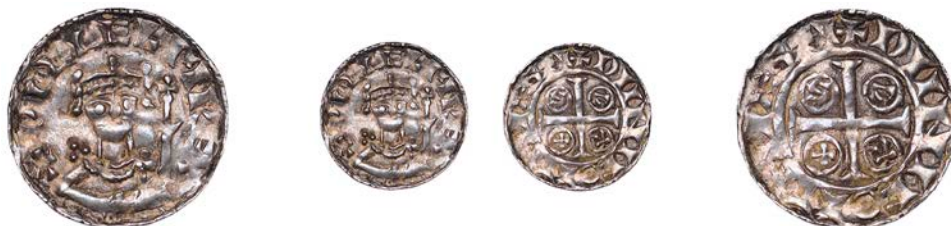
68 Penny, PAXS type [BMC VIII], Hastings , Dunning, DVNIC ON [-]IESTI, 1.34g/12h (Allen 2022, p.175; SCBI South Eastern 1815; HHK 156ff; N 848; S 1257). Better than very fine, golden-grey tone £400-£500

Provenance: DNW Auction 147, 12 June 2018, lot 11; T. Wright Collection