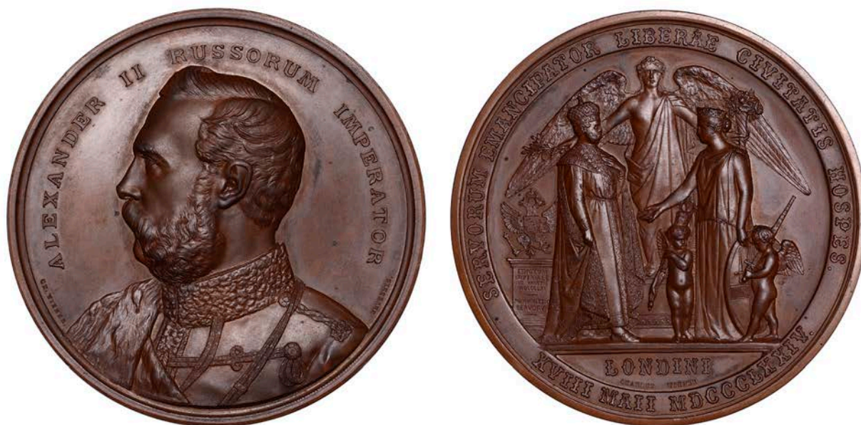
342 Visit of Czar Alexander II to London, 1874, a bronze medal by C. Wiener for the Corporation of the City of London, uniformed bust left, rev. Alexander and Londinia standing, winged Peace behind, 77mm, 212.74g (Diakov 807.1; W & E 1225A.1; BHM 2981; E 1634). Light spotting, otherwise extremely fine; in maroon gilt-blocked case of issue stamped Charles Wiener, Medallist, Brussels £500-£700

Provenance: From a Collection of Great Exhibition and Related Medals, the Property of a Gentleman