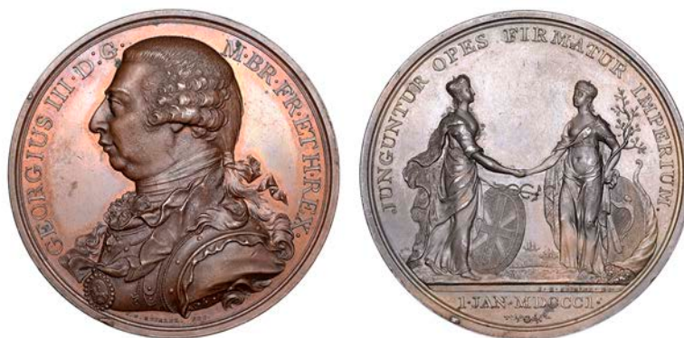
327 Union of Great Britain and Ireland , 1801, a copper medal by C.H. Küchler, armoured bust of George III left, rev. Britannia and Hibernia shaking hands, 48mm, 53.72g (Pollard 24 [obv. 3a]; BHM 458 obv./523 rev.; cf. E 927; cf. Noonans 283, 1267). Extremely fine, reflective fields £100-£150

Provenance: A Collection of Medals relating to C. Cornwallis, 1st Marquis.