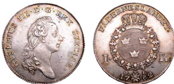
283 Gustav III, Riksdaler, 1782 OL , Stockholm (Dav. 1736; KM 527). Attractive cabinet tone, good very fine £200-£300