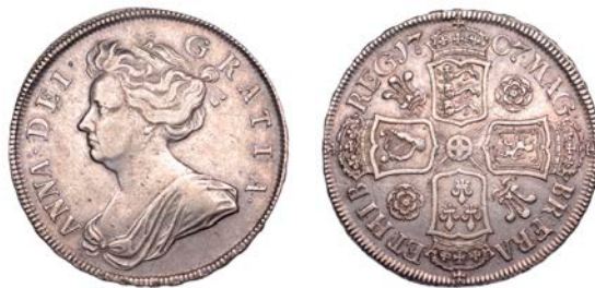
167 Halfcrown, 1707, roses and plumes, single stop after REG, edge SEXTO (ESC 1362; S 3582). Good fine