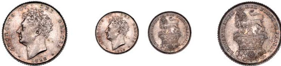
197 Sixpence, 1828 (ESC 2438; S 3815). Light cabinet tone over original lustre, good extremely fine [Graded by NGC as MS 63+]