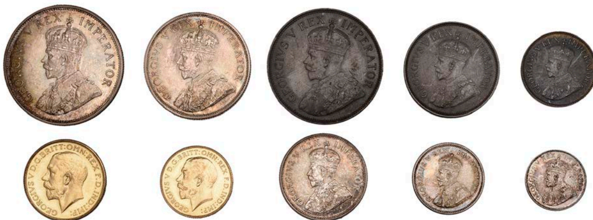
281 George V, Proof Set, 1923, comprising Sovereign, Half-Sovereign, Halfcrown to Farthing (Hern P2; KM PS1) [10]. All with varying degrees of toning and underlying original bloom, otherwise generally about as struck; in original Mappin & Webb fitted case £2,000-£2,600