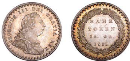
338 Eight Pence, 1811 (ESC 2112; S 3771). Prettily toned, extremely fine