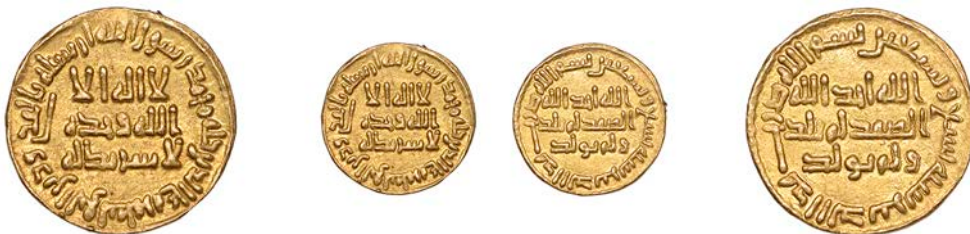
800 Umayyad , temp. Umar , Dinar, no mint name, 99h, 4.27g/9h (Walker 214; ICV 186). Good very fine