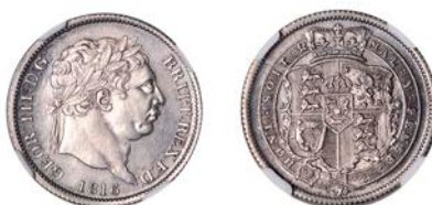
340 Shilling, 1816 (ESC 2140; S 3790). Good extremely fine and prooflike [Graded by NGC as MS 63]