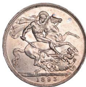
352 Crown, 1893, edge LVI (ESC 2593; S 3937). Cleaned, otherwise nearly extremely fine