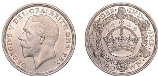
421 Crown, 1928 (ESC 3633; S 4036). Extremely fine