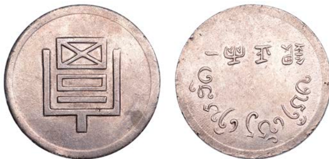
722 Yunnan , Tael, undated (c. 1943-44), Hanoi mint (L&M 433; KM A2A; Kann 940). Light cabinet tone with some hairlines, otherwise extremely fine £100-£120