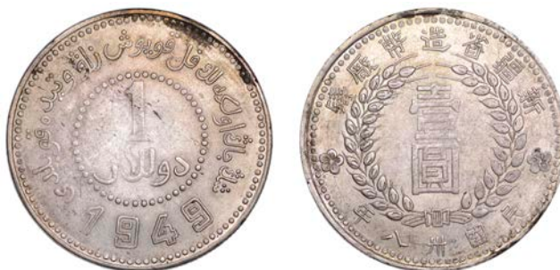
719 Sinkiang , Dollar, 1949, Sinkiang Pouring Factory mint (L&M 840; KM 46.4; Kann 1276). Toned, very fine £100-£120