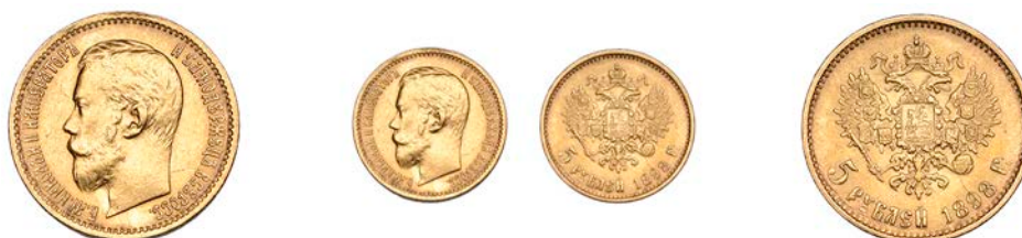
G 869 Nicholas II , 5 Roubles, 1898, St. Petersburg (Fr. 180; KM 62). Very fine