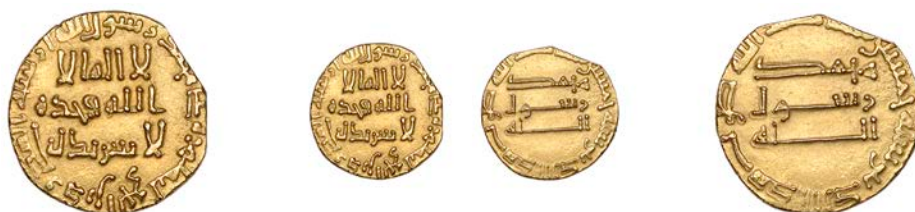
803 Abbasid , temp. Al-Mansur , Dinar, no mint name, 150h, 4.27g/10h (Album 212; Bernardi 51). Clipped, very fine