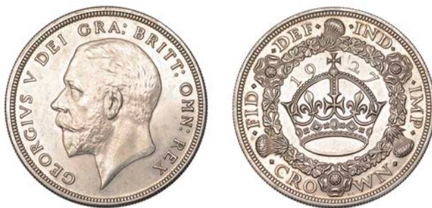
419 Proof Crown, 1927 (ESC 3631; S 4036). Lightly toned, extremely fine