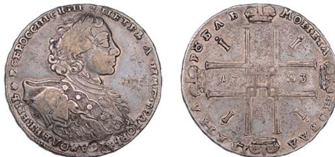
864 Peter I , Rouble, 1723, Red (Diakov 27-48; KM. 162). Flan flaw below bust, otherwise about very fine