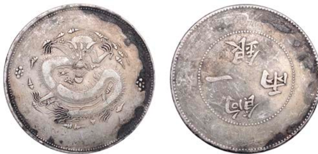
720 Sinkiang , Hsüan-t'ung Sar or Tael, undated (c. 1905-10), Sinkiang mint (L&M 811; KM Y7; Kann 1008). Staining, otherwise fine £100-£120