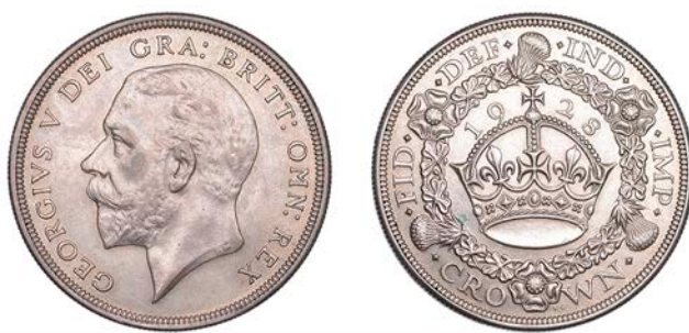
422 Crown, 1928 (ESC 3633; S 4036). Good very fine