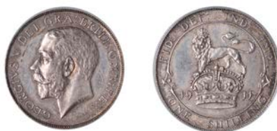
425 Proof Shilling, 1911 (ESC 3800; S 4013). Toned, good extremely fine