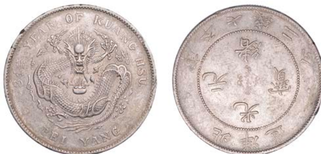
717 Peiyang , in the name of Guangxu , Dollar, yr 34 (1908), Tientsin mint (L&M 465; KM 73.2; Kann 208). Some edge knocks, otherwise good fine £120-£150