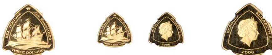
694 Elizabeth II , Proof 3 Dollars, 2006, Sea Venture, from the Shipwreck Series, Llantrisant, 1.56g/12h (KM 141). Brilliant as struck [Graded by NGC as PF 69 Ultra Cameo]