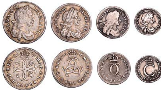
301 Maundy Set, 1673 (ESC 596; S 3392) [4]. Very fine