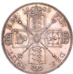
354 Double-Florin, 1889 (ESC 2701; S 3923). Prettily toned with lustrous fields, good extremely fine