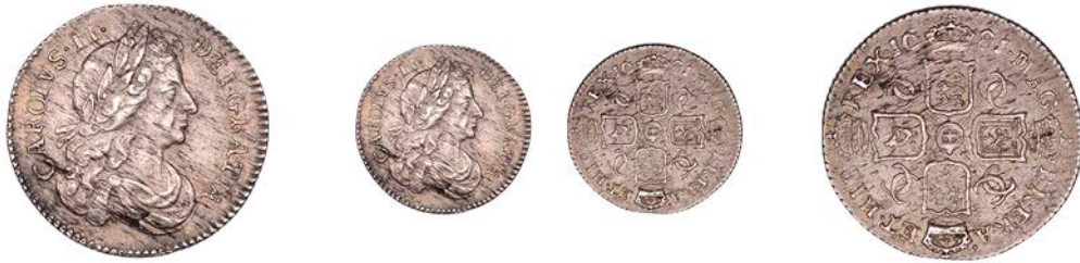
300 Sixpence, 1681 (ESC 577; S 3382). Toned, good very fine, some flecking