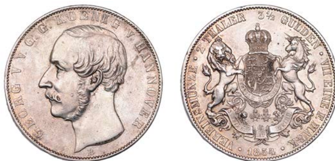
764 George V , 2 Thaler, 1854 B , Hannover (Dav. 681; Jaeger 88; KM 229). Good very fine