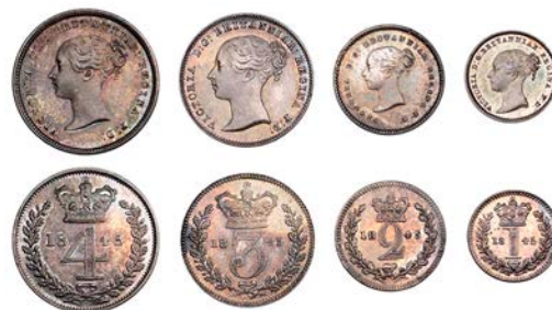
377 Maundy Set, 1845 (ESC 3488; S 3916) [4]. Prettily toned, extremely fine