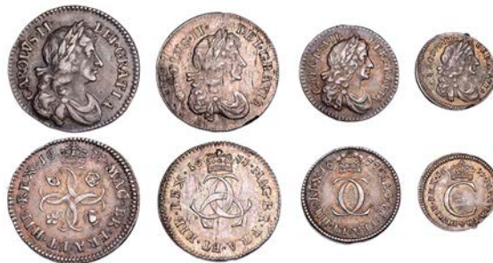
302 Maundy Set, 1677 (ESC 2373; S 3392) [4]. Very fine or better