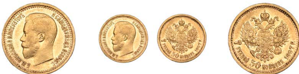
G 867 Nicholas II , 7 Roubles and 50 Kopecks, 1897, St. Petersburg (Fr. 178; KM 63). Very fine