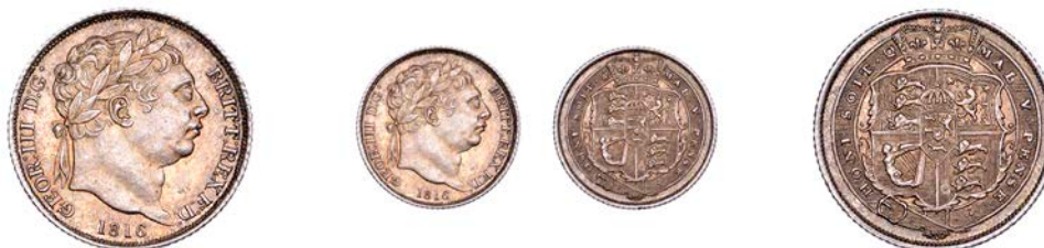
342 Sixpence, 1816 (ESC 2191; S 3791). Cabinet tone, good extremely fine