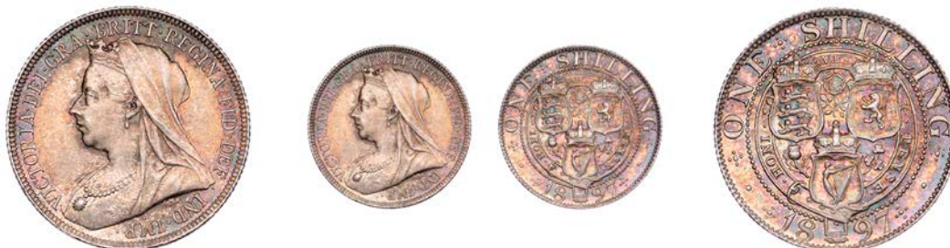
372 Shilling, 1897 (ESC 3162; S 3940A). Iridescent cabinet tone, extremely fine or a little better