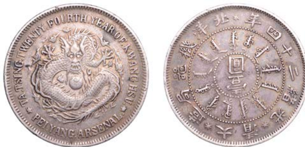
716 Peiyang , in the name of Guangxu , Dollar, yr 24 (1898), Peiyang Arsenal mint (L&M 449; KM 65.2; Kann 191). Toned, good fine £120-£150