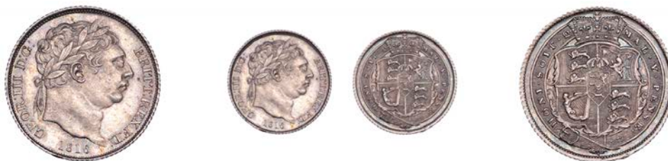
341 Sixpence, 1816 (ESC 2191; S 3791). Lustrous, mint state