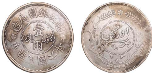
721 Sinkiang , Hsüan-t'ung Sar or Tael, yr 6 (1917), Urumchi mint (L&M 837; KM 45; Kann 1265). Cleaned, otherwise fine £100-£120