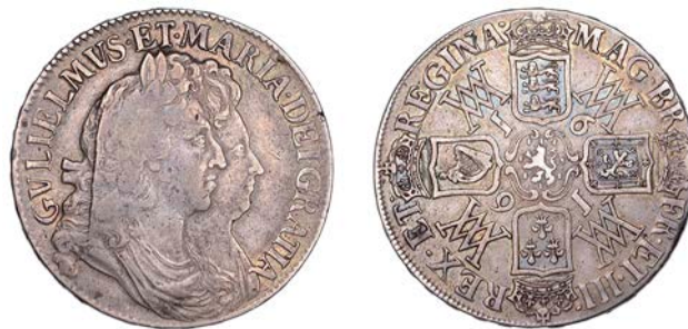
303 Crown, 1691, edge TERTIO (ESC 820; S 3433). The usual die flaw behind king's head, good fine