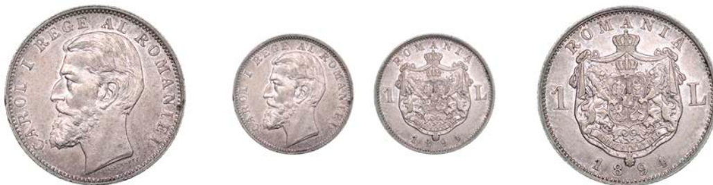
863 Carol I , Leu, 1894, Hamburg (KM 24). Some light residue, otherwise about extremely fine