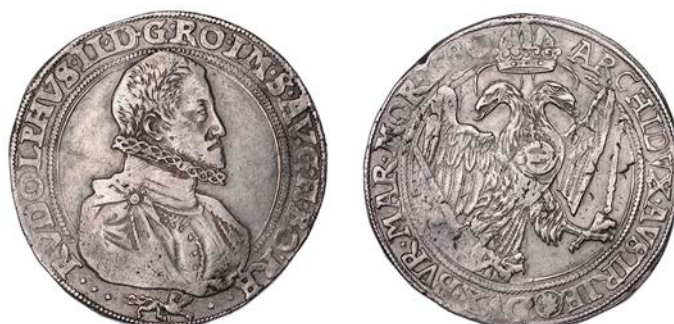
695 Rudolf II , Reichstaler or Joachimsthaler, 1580, Kuttenberg, 28.89g/9h (Dav. 8079). Very fine, rare