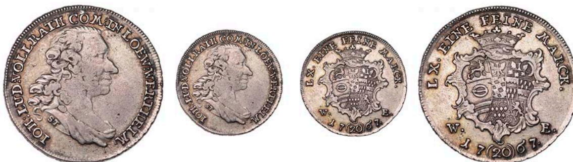
765 Johann Ludwig Volrad , 20 Kreuzer or Kopfstück, 1767, Wertheim (Wibel 120 var.). Toned, very fine and very rare £200-£260