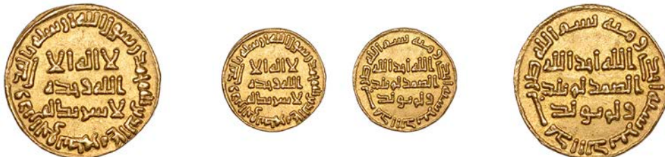
801 Umayyad , temp. Umar , Dinar, no mint name, 101h, 4.28g/6h (Walker 218; ICV 192). Good very fine