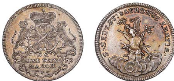
767 Johann Aloys I , Half-Thaler, 1759, Sebastiansgulden (Löff. 412; KM 11). Uneven cabinet tone, better than very fine, rare £100-£120