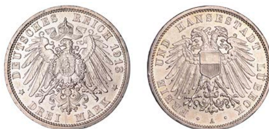
766 Free City , 3 Mark, 1913 A , Berlin (Jaeger 82; KM 215). Lustrous, good extremely fine