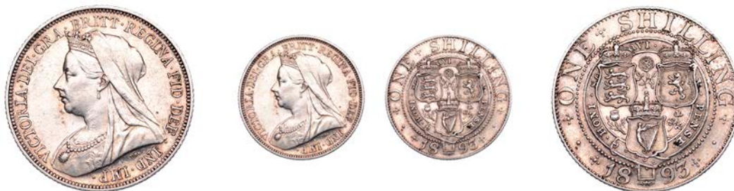
371 Proof Shilling, 1893 (ESC 1362; S 3940). Impaired by cleaning, otherwise nearly extremely fine