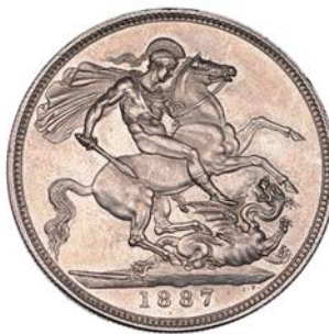
350 Crown, 1887 (ESC 2585; S 3921). Cleaned, otherwise extremely fine