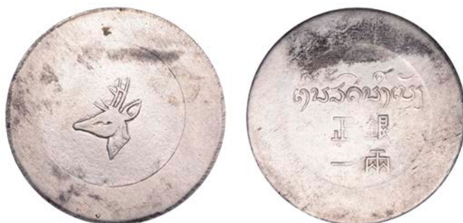
723 Yunnan , Tael, undated (c. 1943-44), Hanoi mint (L&M 435; KM A3; Kann 939). Harshly cleaned with some staining, otherwise fine £100-£120