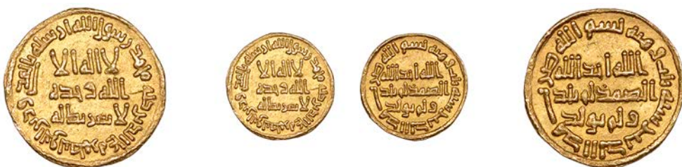
802 Umayyad , temp. Yazid II , Dinar, no mint, 103h, 4.27g/6h (Walker 220; ICV 196). Better than very fine