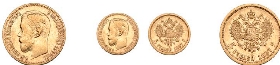
G 868 Nicholas II , 5 Roubles, 1897, St. Petersburg (Fr. 180; KM 62). Very fine