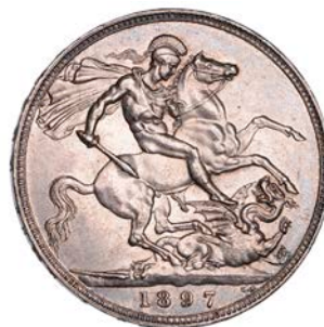
353 Crown, 1897, edge LXI (ESC 2602; S 3937). About extremely fine