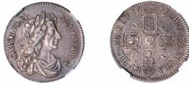
299 Sixpence, 1676/5 (ESC 570; S 3382). Better than very fine, scarce [Graded by NGC as XF 45]