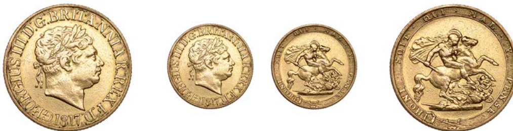
G 339 Sovereign, 1817 (Hill 1; S 3785). Good fine