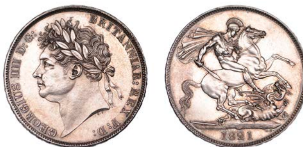
343 Crown, 1821, edge SECUNDO (ESC 2310; S 3805). Rather hairlined, otherwise extremely fine