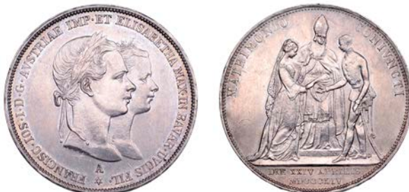
690 Franz Joseph I , 2 Gulden, 1854 A , Wedding of Franz and Sisi, Vienna (Dav. 19; KM M3). Cleaned, otherwise very fine