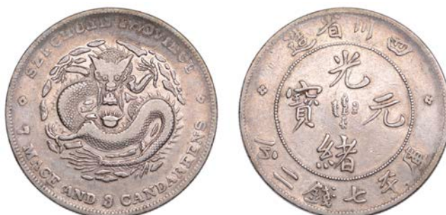
718 Szechuan , in the name of Guangxu , Dollar, undated (c. 1901-08), 7 Mace and 3 Candareens, Chengdu mint (L&M 346; KM 238.3; Kann 143r). Fine, the variety very rare £150-£200