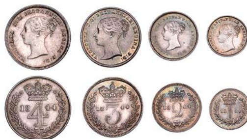
376 Maundy Set, 1844 (ESC 3487; S 3916) [4]. Prettily toned, good extremely fine, scarce