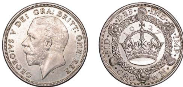
420 Proof Crown, 1927 (ESC 3631; S 4036). Lightly cleaned, otherwise nearly extremely fine