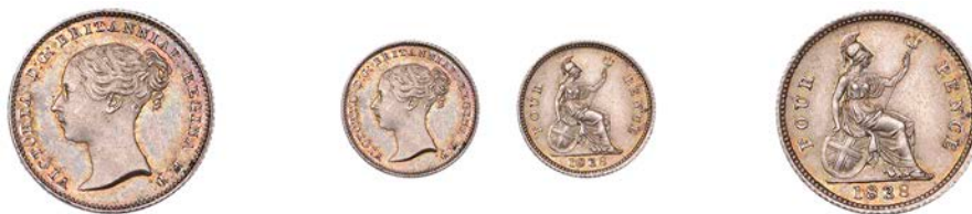
375 Groat, 1838 (ESC 3321; S 3913). Prettily toned and lustrous, good extremely fine