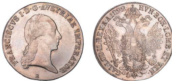
689 Francis I , Thaler, 1822 B , Kremnica (Dav. 7; KM 2162). Cleaned, otherwise very fine, reverse better