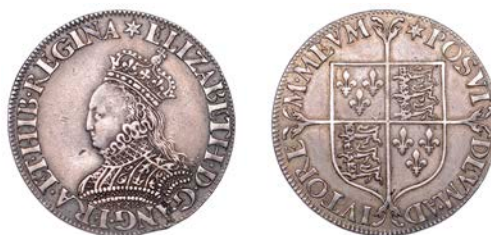
51 Shilling, mm. star, decorated dress, intermediate flan, 30mm, 6.45g/6h (Borden/Brown 16, O3/R3; N 2023; S 2591). Very fine