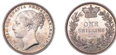
318 Shilling, 1873, die 47, 5.66g/6h (ESC 3043; S 3906A). Some surface hairlining, otherwise extremely fine or better, proof-like fields