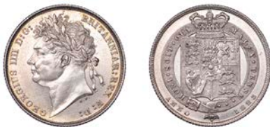
258 Shilling, 1823, 5.64g/6h (ESC 2398; S 3811). Bright from past cleaning, otherwise about extremely fine