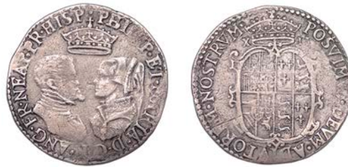
28 Shilling, undated, full titles, mark of value, 5.80g/3h (N 1967; S 2498). Good fine £300-£400