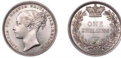
316 Shilling, 1871, die 6, 5.66g/6h (ESC 3039; S 3906A). Extremely fine