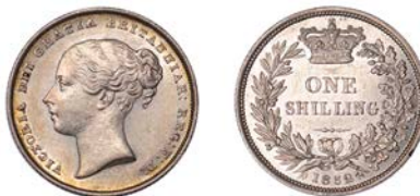
292 Shilling, 1852 , 5.64g/6h (ESC 3001; S 3904). About extremely fine £100-£150