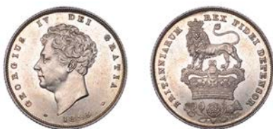
262 Shilling, 1825, type 3, 5.63g/6h (ESC 2405; S 3812). Bright appearance, extremely fine