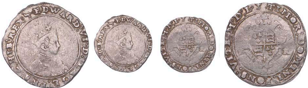
14 Shilling, Tower II, MDL [1550], mm. martlet on obv., crowned leopard's head on rev., bust 5, 2.58g/1h (Shuttlewood 245 [= DNW 91, 11], same dies; N 1919/1; S 2466). Surfaces lightly scratched, otherwise good fine, struck on a lightweight flan; the combination of mint marks extremely rare

Provenance: R.A. Shuttlewood Collection, Spink Auction 151, 15 March 2001, lot 245; S.A. Bole Collection, Part II, DNW Auction 90, 9 December 2010, lot 1484 (part); London Coin Auction 156 (Bracknell), 5 March 2017, lot 1791; DNW Auction 188, 9 February 2021, lot 134; DNW Auction 190, 6-7 April 2021, lot 486