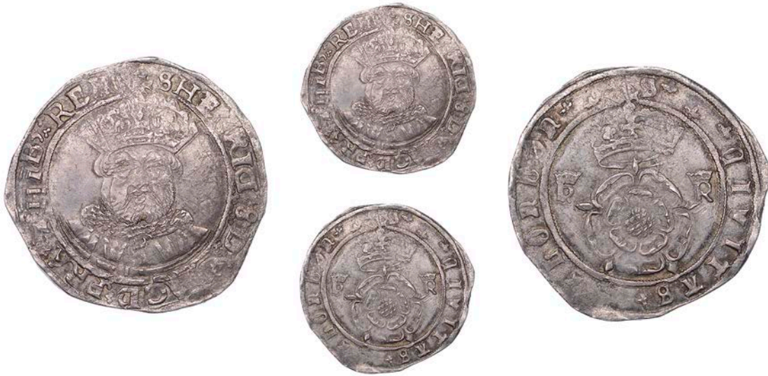
4 Testoon, Southwark, mm. S, crowned bust facing, HENRID 8 D G FRA Z HIB REX, D reversed, rev. CIVITAS LONDON divided by florets, crowned rose dividing crowned H R, Roman lettering, broken saltire stops, 7.95g/12h (Jacob O1/R1; Whitton (1); N 1842; S 2367). Legend partly weak, otherwise about very fine, portrait with good detail, light grey tone, rare £2,400-£3,000