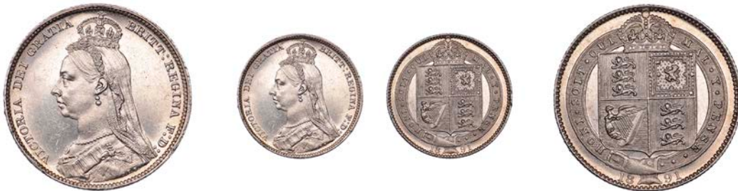
341 Shilling, 1891 , 5.66g/12h (ESC 3145; S 3927). Brilliant and virtually as struck £90-£120