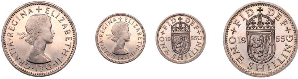
407 Proof Shilling, 1955 , Scottish type, edge grained, 5.68g/12h (ESC 4490; Davies/Groom 3+D). Brilliant FDC, extremely rare