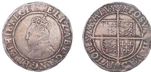
48 Shilling, mm. 2 [1602], bust 6B, 5.59g/9h (BCW 2-1/2-a1; N 2014; S 2584). Good fine, toned