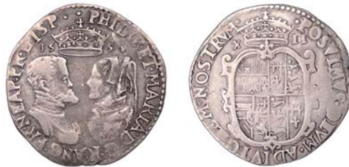
29 Shilling, 1554, full titles, mark of value, 5.77g/3h (N 1967; S 2500). About fine £180-£220