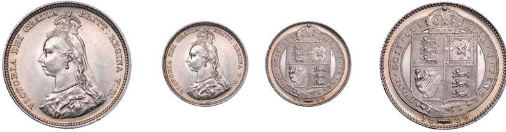
337 Shilling, 1889 , small head, 5.68g/12h (ESC 3141; S 3926). Minor bagmarks, otherwise brilliant, practically mint state, very rare £600-£800