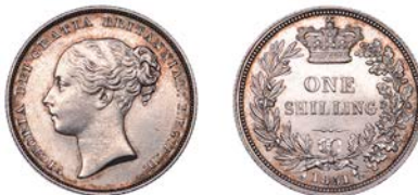
291 Shilling, 1851 , 5.65g/6h (ESC 2999; S 3904). Extremely fine, peripheral toning, rare £400-£500

Provenance: G.G. Sommerville Collection, DNW Auction 102, 18 September 2012, lot 2805