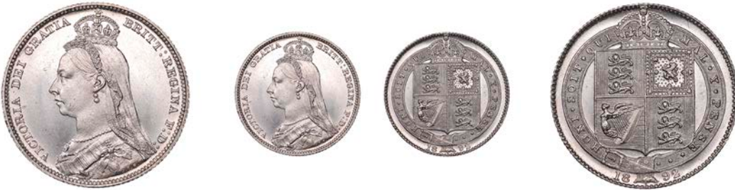
342 Shilling, 1892 , 5.64g/12h (ESC 3147; S 3927). Brilliant and virtually as struck [removed from a certified NGC holder (4241057-009), labelled MS 65] £90-£120