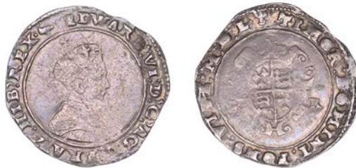
13 Shilling, Tower II, MDL [1550], mm. martlet on obv., crowned leopard's head on rev., bust 5, 4.72g/9h (Shuttlewood 245, this coin; N 1919/1; S 2466). From slightly rusty dies, better than fine, the combination of mint marks extremely rare