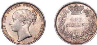
310 Shilling, 1866, die 30, 5.65g/6h (ESC 3027; S 3905). Extremely fine

Provenance: A Collection of 19th Century Shillings, the property of a Nobleman, Spink Auction 101, 24 November 1993, lot 301