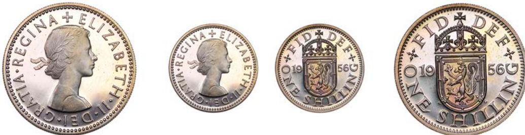
409 Proof Shilling, 1956 , Scottish type, edge grained, 5.64g/12h (ESC 4455). Trifling carbon specks on reverse, otherwise brilliant, extremely rare [removed from a certified PCGS holder (689082.67/36667802), labelled PR 67 DCAM]

Provenance: Baldwin 'Basement'; Baldwin's of St James's Auction 41, 19 January 2020, lot 231