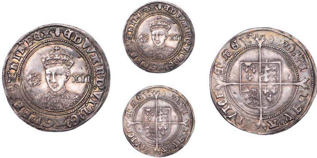
27 Shilling, mm. tun, 6.01g/9h (N 1937; S 2482). Reverse legend partly weak, otherwise very fine, obverse better and with a good portrait, toned £600-£800

Provenance: With Seaby 1974; bt Cambridge Coins