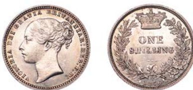
321 Shilling, 1876, die 3, 5.68g/6h (ESC 3046; S 3906A). Extremely fine, brilliant fields