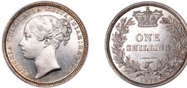
317 Shilling, 1872, die 60, 5.67g/6h (ESC 3042; S 3906A). Minor hairlines, otherwise brilliant, practically mint state with proof-like appearance, most attractive [removed from a certified PCGS holder (205251 64/28188499), labelled MS 64]