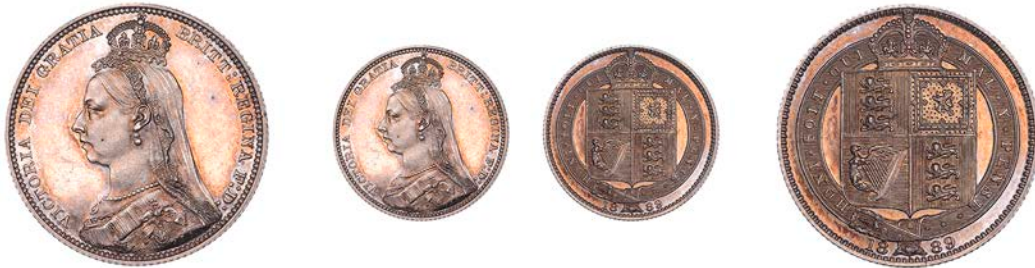
339 Proof Shilling, 1889 , large head, edge grained, 5.67g/12h (ESC 3143; S 3927). Trifling hairlines and a spot on Queen's cheek, otherwise brilliant and virtually as struck, toned, very rare £1,200-£1,500