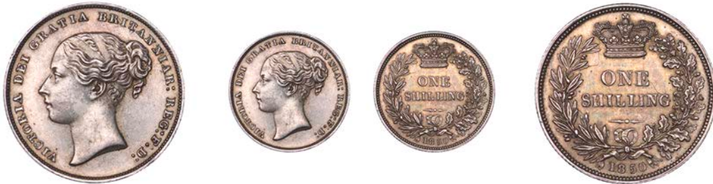
290 Shilling, 1850 , 5.63g/6h (ESC 2996; S 3904). About extremely fine, extremely rare £3,000-£5,000

Provenance: A. Wayne Collection, London Coins Auction 113 (Bracknell), 5-6 June 2006, lot 1284; R. Harris Collection, London Coins Auction 124, 1-2 March 2009, lot 862; C. Tasker Collection, Spink Auction 254, 3-4 July 2018, lot 1032