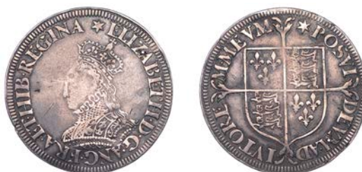
50 Shilling, mm. star, decorated dress, intermediate flan, 31mm, 6.10g/6h (Borden/Brown 16, O1/R2; N 2023; S 2591). Good fine