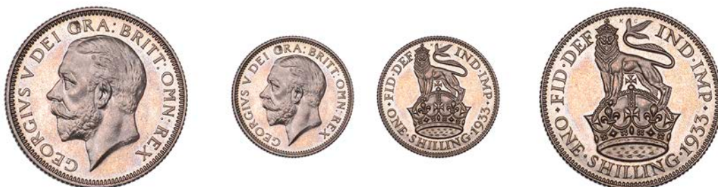
378 Proof Shilling, 1933, edge grained, 5.66g/12h (ESC 3846). Small spot on G of GRA, otherwise brilliant and practically as struck, very rare [removed from a certified PCGS holder (783703.65/35170362), labelled PR 65]