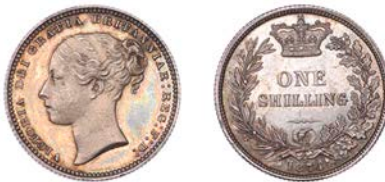
319 Shilling, 1874, crosslet 4, die 5, 5.67g/6h (ESC 3044; S 3906A). Practically mint state, attractively toned

Provenance: G.G. Sommerville Collection, DNW Auction 102, 18 September 2012, lot 2830