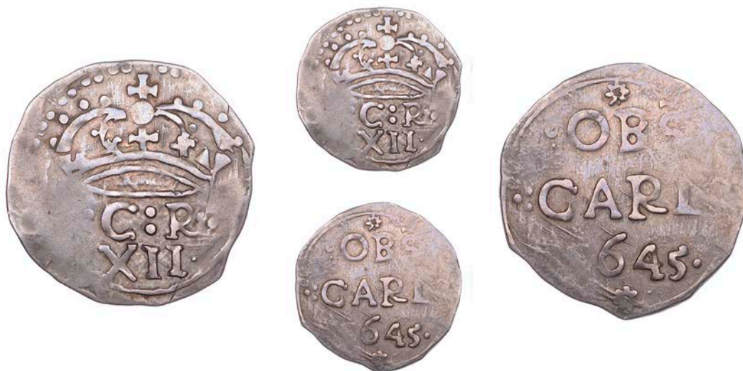
126 Shilling, 1645 , C R crowned dividing trefoil of pellets, value below, rev. OB CARL and date in 3 lines, rosette above and below, 5.18g/1h (Hird 244; SCBI Brooker 1220, same dies; N 2635; S 3138). Flat in places, otherwise very fine or better, attractive cabinet tone £10,000-£15,000

Provenance: H.M. Lingford Collection; Baldwin's of St James's Auction 40, 21 November 2019, lot 48; M. Gietzelt Collection, DNW Auction 195, 22 September 2021, lot 158.