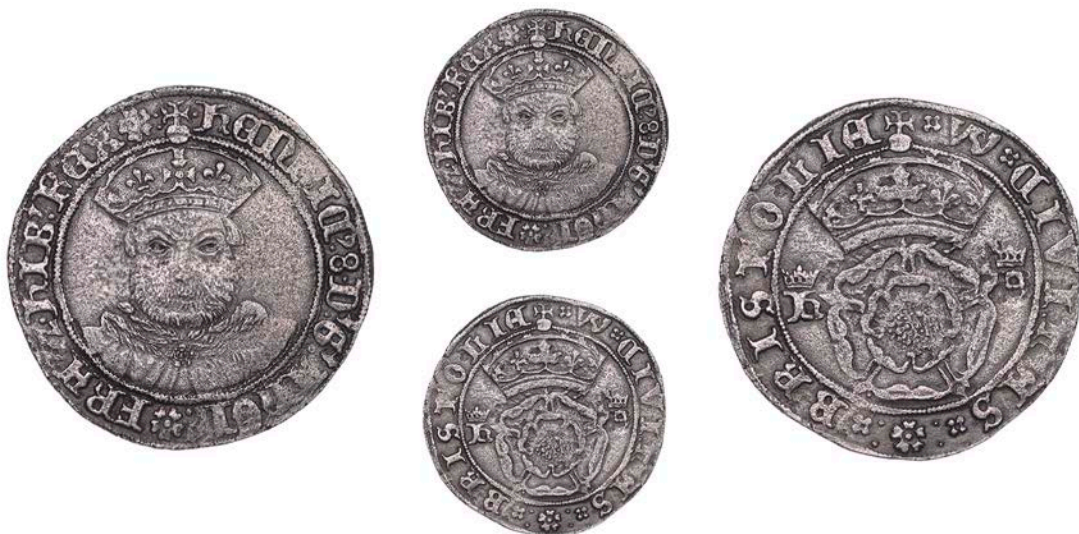
6 Testoon, Bristol, mm. WS [William Sharington] on rev. only, crowned bust facing, HENRIC 8 D G ANGL FRA Z HIB REX, rev. CIVITAS BRISTOLIE, crowned rose dividing crowned H R, roses in legend, quatrefoil stops, Evenet lettering, small pellet below rose, 7.17g/3h (Whitton 2; N 1843; S 2368). Fields tooled, otherwise very fine and round, rare £800-£1,000