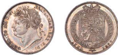
259 Shilling, 1824, 5.66g/6h (ESC 2400; S 3811). Light surface marks, otherwise extremely fine, olive toning