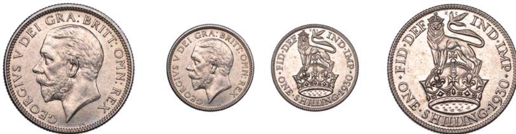
376 Shilling, 1930, 5.69g/12h (ESC 3837; S 4039). Brilliant mint state