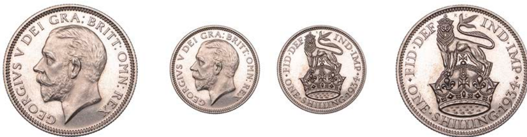
380 Proof Shilling, 1934, edge grained, 5.66g/12h (ESC 3848). Brilliant FDC, extremely rare