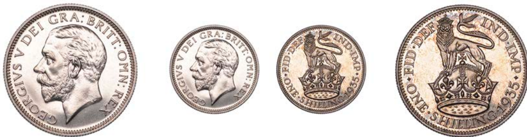
381 Proof Shilling, 1935, edge grained, 5.64g/12h (ESC 3851). Brilliant FDC, very rare [removed from a certified PCGS holder (783711.66/32660471), labelled PR 66]