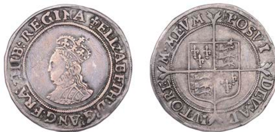
30 Shilling, mm. lis, beaded inner circles, bust 2B, reads REGINA, 6.05g/9h (BCW LS-5C/LS-g2; N 1985; S 2549). About very fine, toned £600-£800