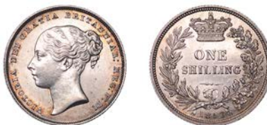
293 Shilling, 1853 , 5.66g/6h (ESC 3002; S 3904). Extremely fine £120-£150