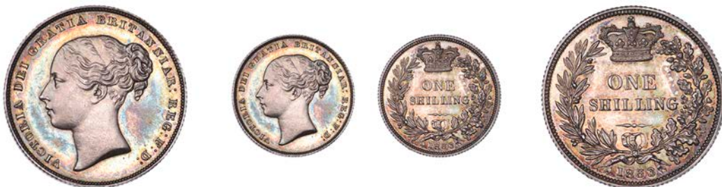
294 Proof Shilling, 1853 , edge grained, 5.66g/6h (ESC 3003; S 3904). Light hairlines and a little light surface discolouration to right of mark of value, otherwise brilliant and virtually as struck, deeply toned, rare £1,500-£2,000

Provenance: L. Roberts Collection, DNW Auction 135, 21-4 March 2016, lot 256