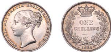
308 Shilling, 1865, die 108, 5.66g/6h (ESC 3025; S 3905). Extremely fine