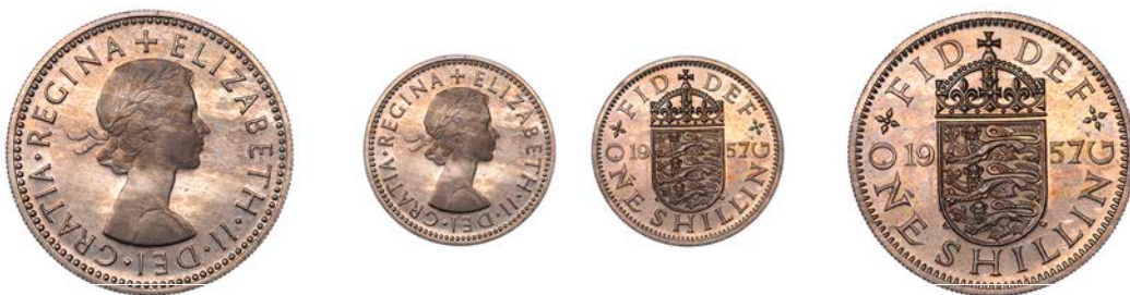
410 Proof Shilling, 1957 , English type, edge grained, 5.61g/12h (ESC 4461). Streaky tone and some light spotting, otherwise brilliant and virtually as struck, extremely rare [removed from a certified PCGS holder (431292.63/32660465), labelled PR 63 CAM]

Provenance: Baldwin 'Basement'; Baldwin's of St James's Auction 41, 19 January 2020, lot 232