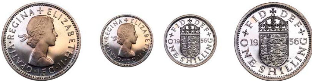
408 Proof Shilling, 1956 , English type, edge grained, 5.51g/12h (ESC 4458; Davies/Groom 3+C). Light speckling on upper obverse, otherwise brilliant, extremely rare [removed from a certified PCGS holder (689081.66/36667801), labelled PR 66 DCAM]

Provenance: Baldwin's of St James's Auction 22, 27 September 2018, lot 1258