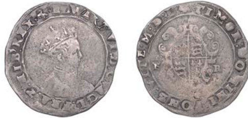
11 Shilling, Tower I, MDL [1550], mm. swan (no. 2 on obv., no. 1 on rev.), bust 5, 4.50g/12h (N 1919/1; S 2466). About fine