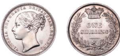
315 Shilling, 1870, die 19, 5.66g/6h (ESC 3038; S 3906A). Obverse bright from past cleaning, otherwise extremely fine or better £100-£150