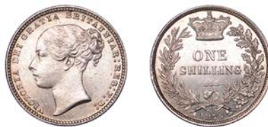
320 Shilling, 1875, die 63, 5.66g/6h (ESC 3045; S 3906A). Some light scratches and scuffing, otherwise extremely fine, reflective fields

Provenance: L. Roberts Collection, DNW Auction 135, 21-4 March 2016, lot 282