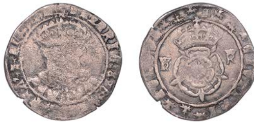
5 Testoon, Southwark, mm. S, crowned bust facing, HENRIC 8 D [—] FRA Z HIB [—], rev. CIVITAS LONDON divided by florets, crowned rose dividing crowned H R, mostly Lombardic lettering, broken saltire stops, 6.39g/4h (Jacob O2/R2; Whitton (2); N 1842; S 2367). Face flat, otherwise fine, rare £600-£800