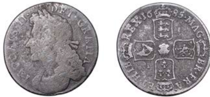
An excessively rare 1685 plume Shilling

176 Shilling, 1685 , plume in centre of rev., harp with 5 strings, 5.61g/6h (ESC 763; S 3411). Mediocre, excessively rare £1,000-£1,500