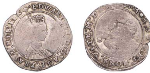
10 Shilling, Tower I, MDL [1550], mm. swan (no. 1 on obv.), bust 5, 5.06g/10h (N 1919/1; S 2466). Fair