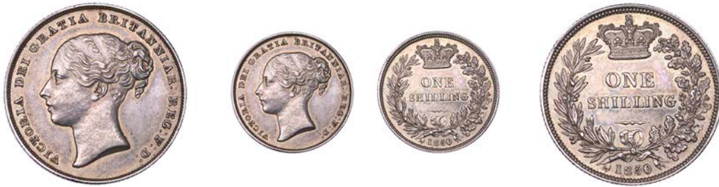
289 Shilling, 1850/46 , 5.66g/6h (ESC 2997; cf. S 3904). Good very fine and toned, extremely rare [removed from a certified NGC holder (3639097-001), labelled VF 30] £2,400-£3,000