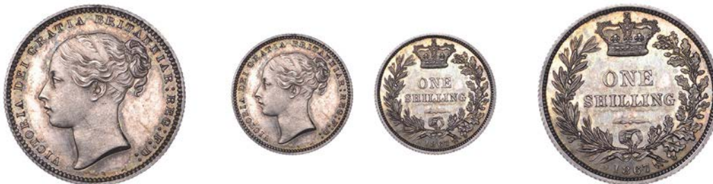
312 Proof Shilling, 1867, third head, no die no., edge grained, 5.59g/6h (ESC 3032; Oddie, BNS Blog 17 May 2024, p.6, 5B, this coin illustrated ; S 3906). Trifling hairlines, otherwise brilliant and virtually as struck, attractively toned, extremely rare

A copy of the relevant page from the blog article accompanies the coin