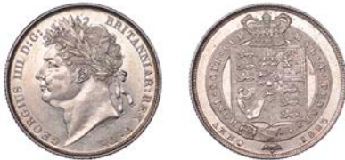
261 Shilling, 1825, type 2, 5.67g/6h (ESC 2402; S 3811). Bright appearance, good extremely fine

Provenance: Glendining Auction, 30 October 1974, lot 365; Spink Auction 196, 24-5 September 2008, lot 1056; bt Baldwin 2009