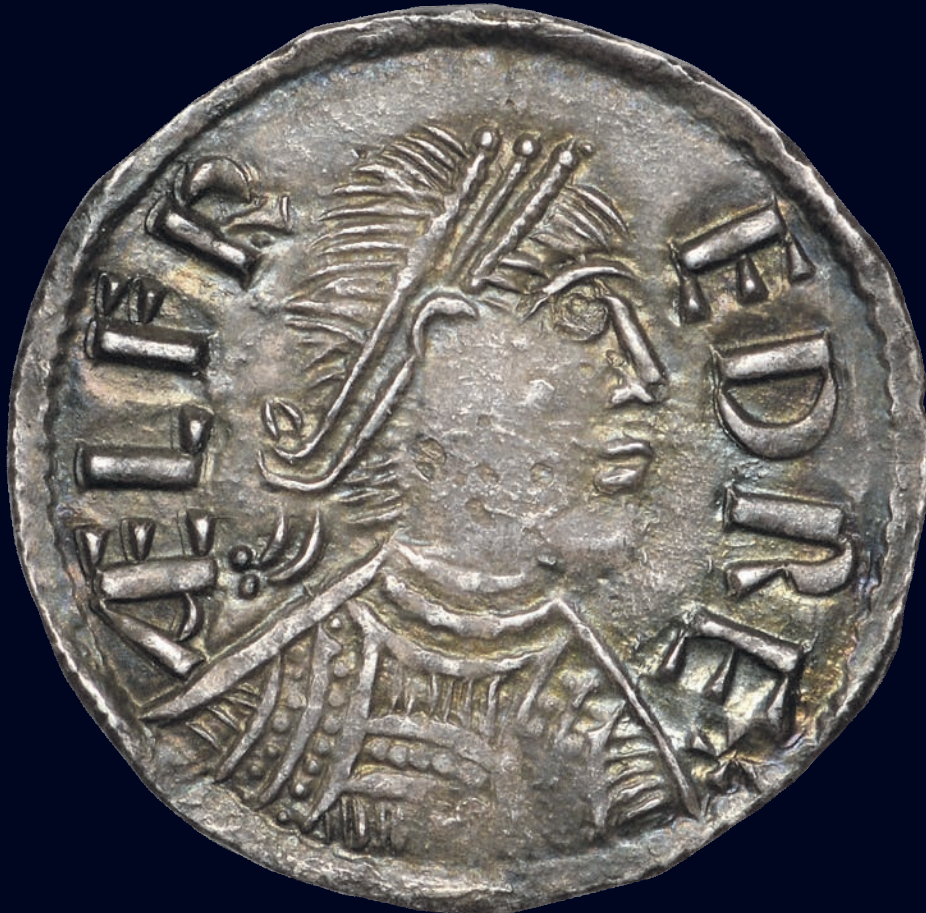
LOT 111: ALFRED THE GREAT (871-99) PENNY ESTIMATE: ££6,000-£8,000

ALL ENQUIRIES PLEASE CONTACT TIM WILKES ON 020 7016 1700 OR EMAIL COINS@NOONANS.CO.UK