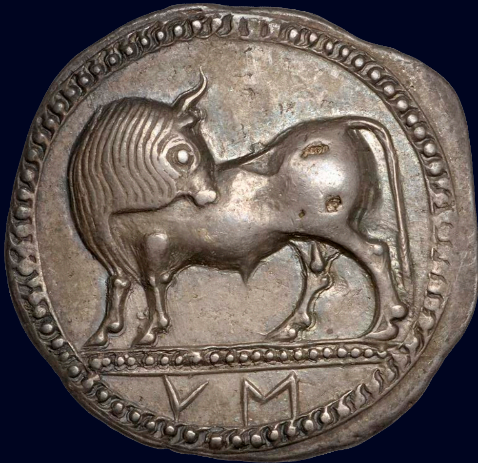
LUCANIA, SYBARIS, NOMOS, C.550–510 ESTIMATE: £2,000–£3,000

ALL ENQUIRIES PLEASE CONTACT TIM WILKES ON 020 7016 1700 OR EMAIL COINS@NOONANS.CO.UK