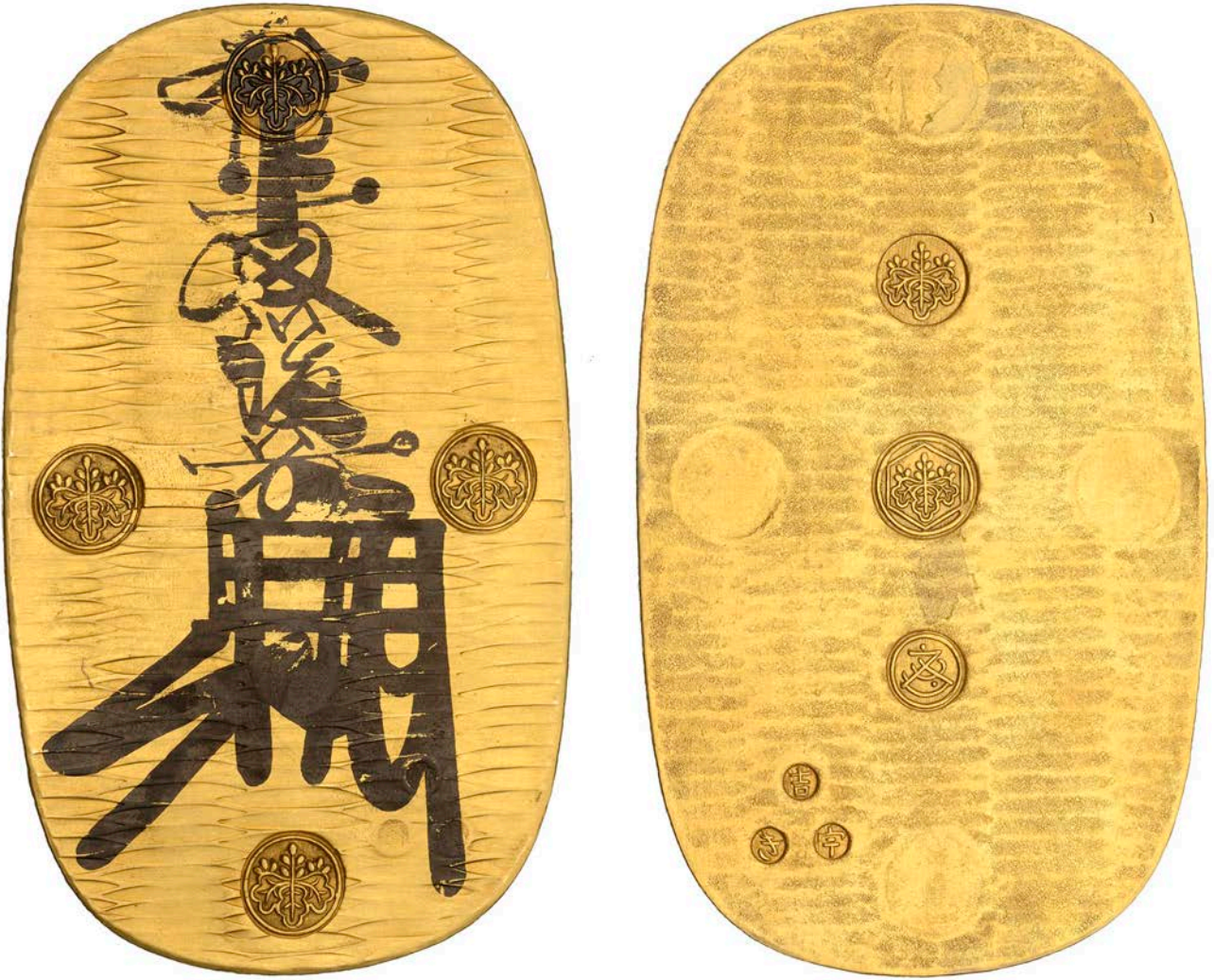
x 34 MANEN , gold Oban [1860-2], 135 x 81mm, 113.21g (JNDA 09-11; J & V A7; KM. C24a.2; F 7). Extremely fine £6,000-£8,000