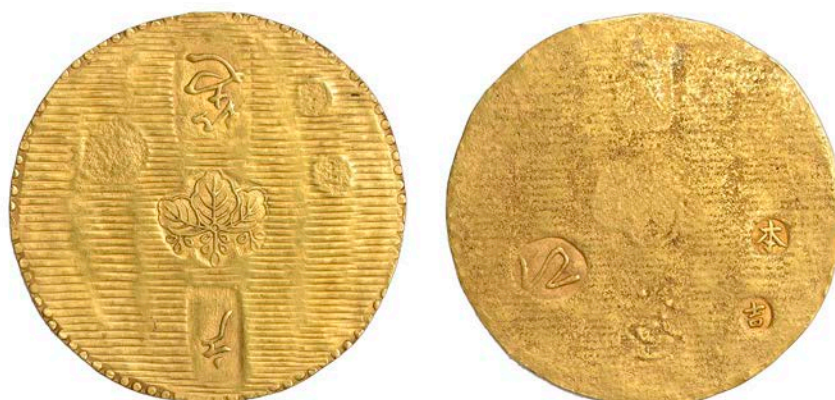
x 49 Fantasy round gold Koban, 53mm, 16.02g