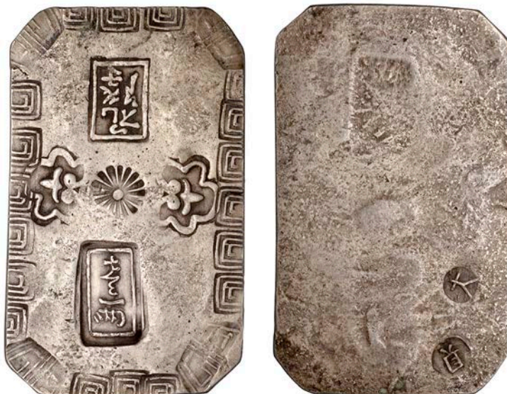
x 47 Fantasy silver Gin, 72 x 44mm, 39.53g