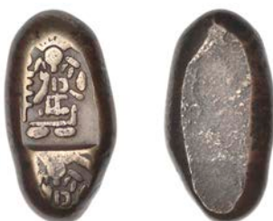
x 52 Fantasy Mameita-Gin, 21.22g