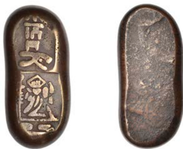
x 50 Fantasy silver Mameita-Gin, 30.81g