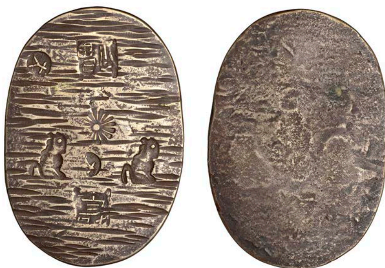
x 54 Fantasy silver Tane Sen Gin, 70 x 49mm, 41.32g