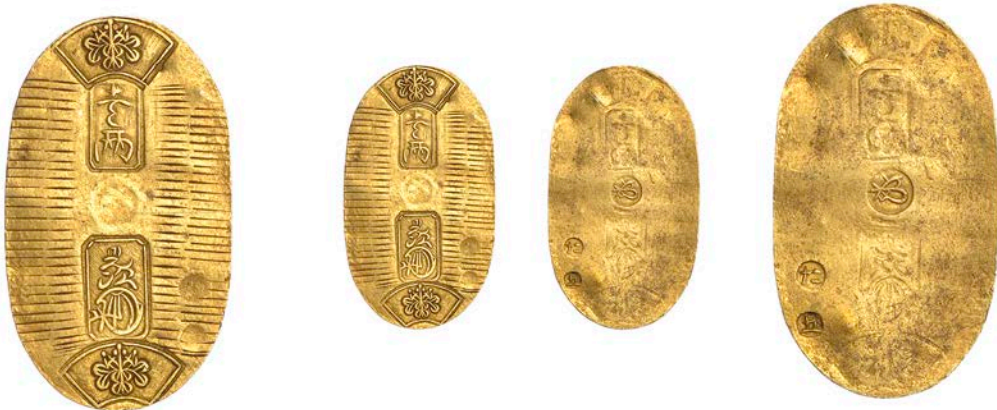
x 35 MANEN , gold Koban [1860-7], 36 x 21mm, 3.32g (JNDA 09-23; J & V B109; KM. C22d; F 17). Good very fine £400-£500