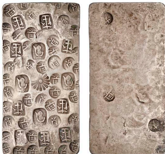
x 48 Fantasy silver Kiri-Gin, 83 x 42mm, 43.94g