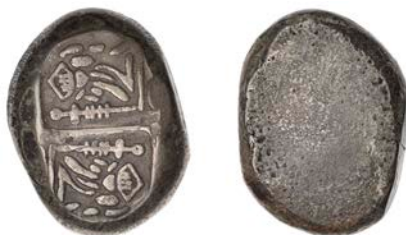
x 51 Fantasy Mameita-Gin, 23.92g